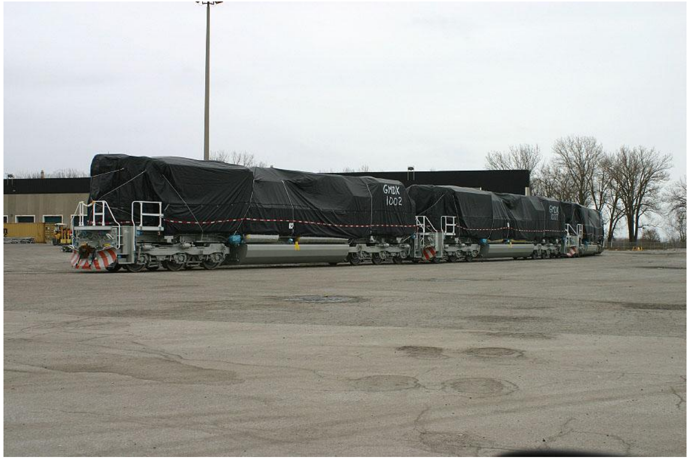
GMDX1002, GMDX1007, GMDX1000 & GMDX1003 at W52 Toronto harbour on 19th November.