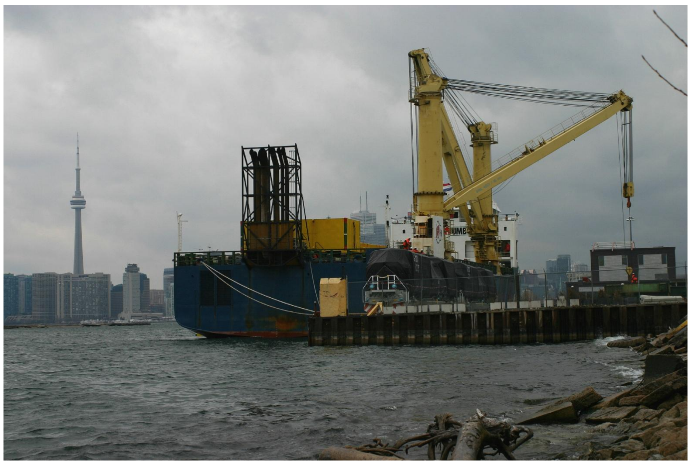
Heavy lift ship MV Jumbo Vision at Toronto harbour with GMDX1005 & GMDX1006 adjacent to the ship awaitingloading on 26th November with the City of Toronto and CN tower in background.