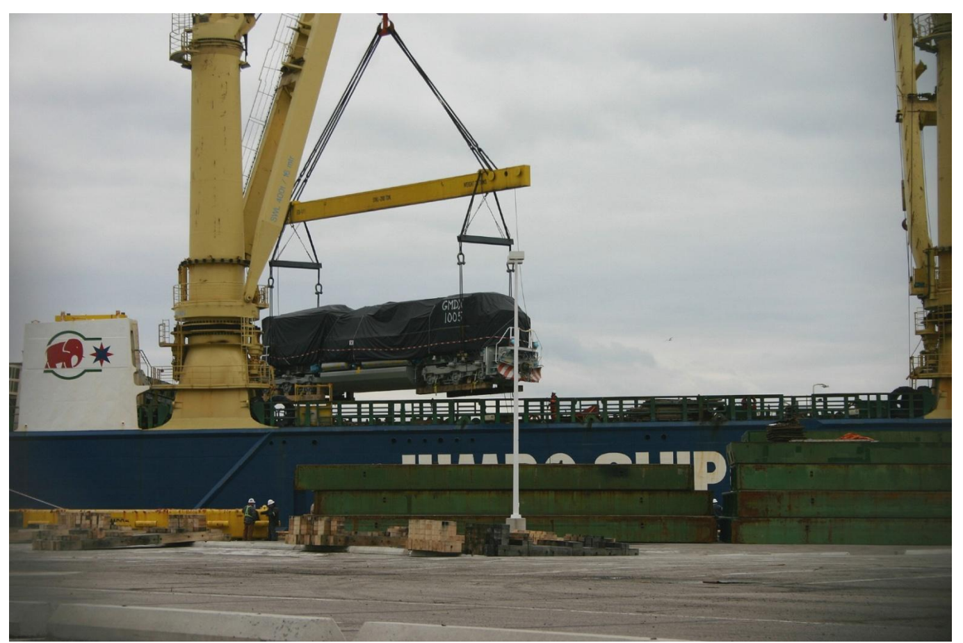
GMDX1005 swung onboard by MV Jumbo Vision heavy lift 600t ships crane then lowered into hold