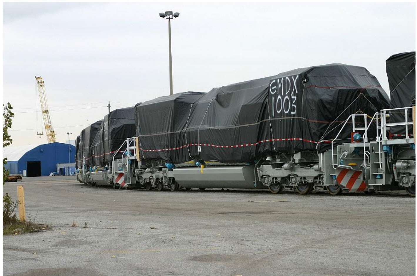
GMDX 1003, GMDX1000, GMDX1007 & GMDX1002 at W52 Toronto harbour on 19th November.