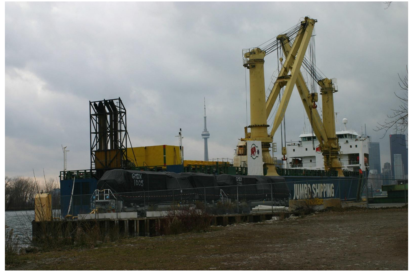
Another view of MV Jumbo Vision, GMDX1005 & GMDX1006 and City of Toronto on 26/11.