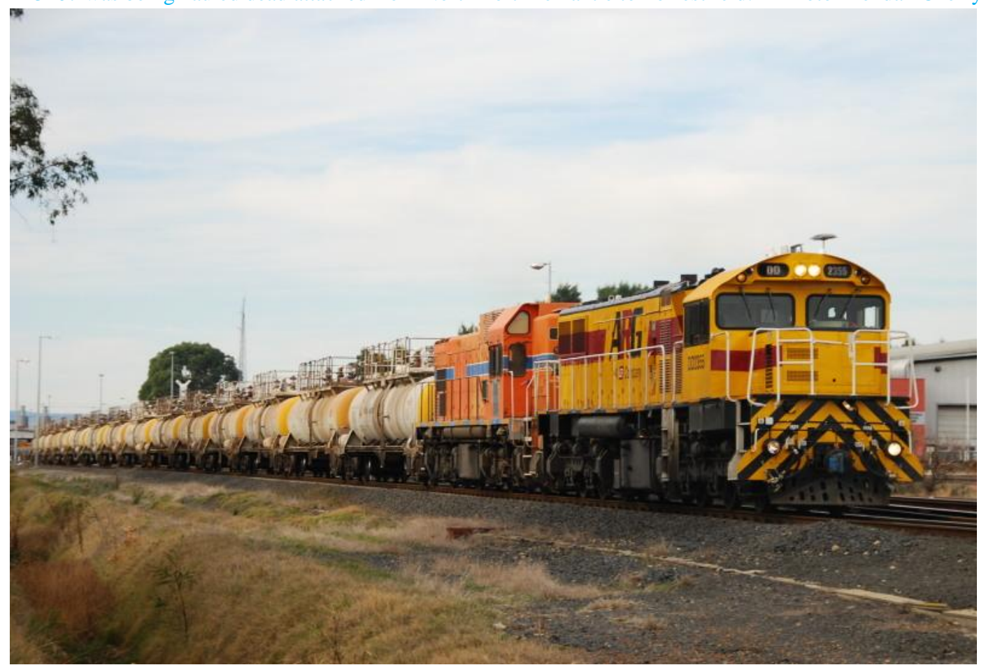
DD2355 and AB1504 both cab forward run empty caustic soda tankers through Picton on way to Bunbury Inner harbour to be loaded on May 30th.