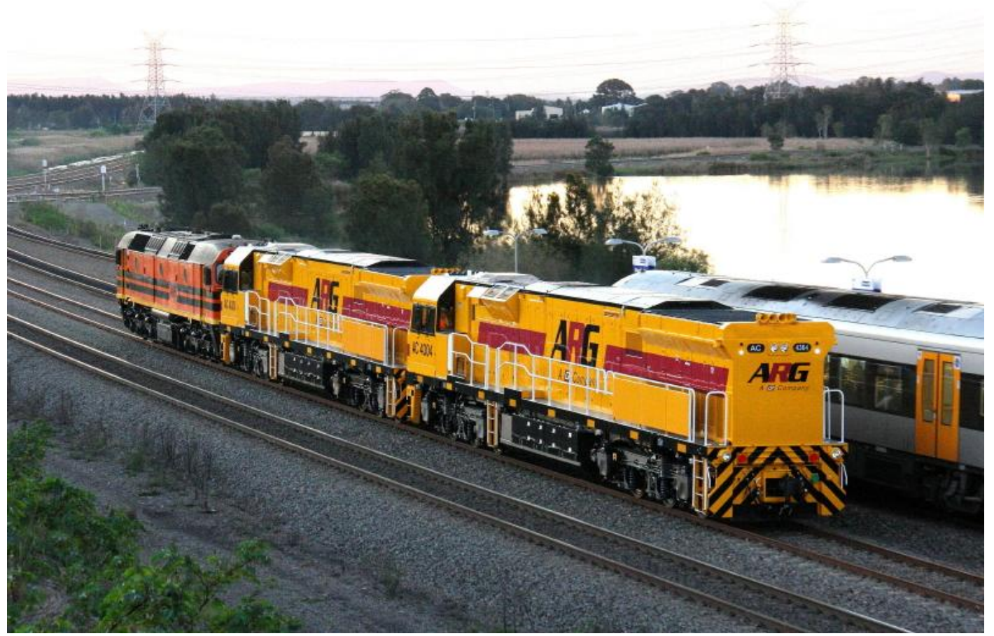
AC4304, AC4301 both long end leading and 2208 run D458 return light engine trial going back to United Group Rail Broadmeadow passing through Warabrook on June 5th.