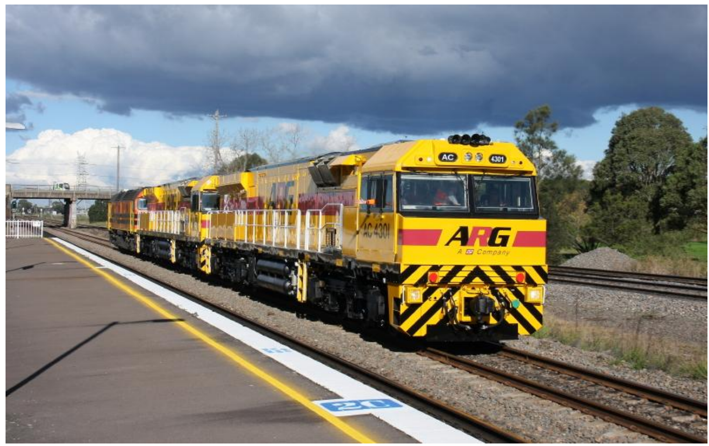
AC4301, AC4304 & 2208 on D457 light engine trail on June 5th from United Group Rail to Telarah in NSW Hunter region seen passing through Tarro.