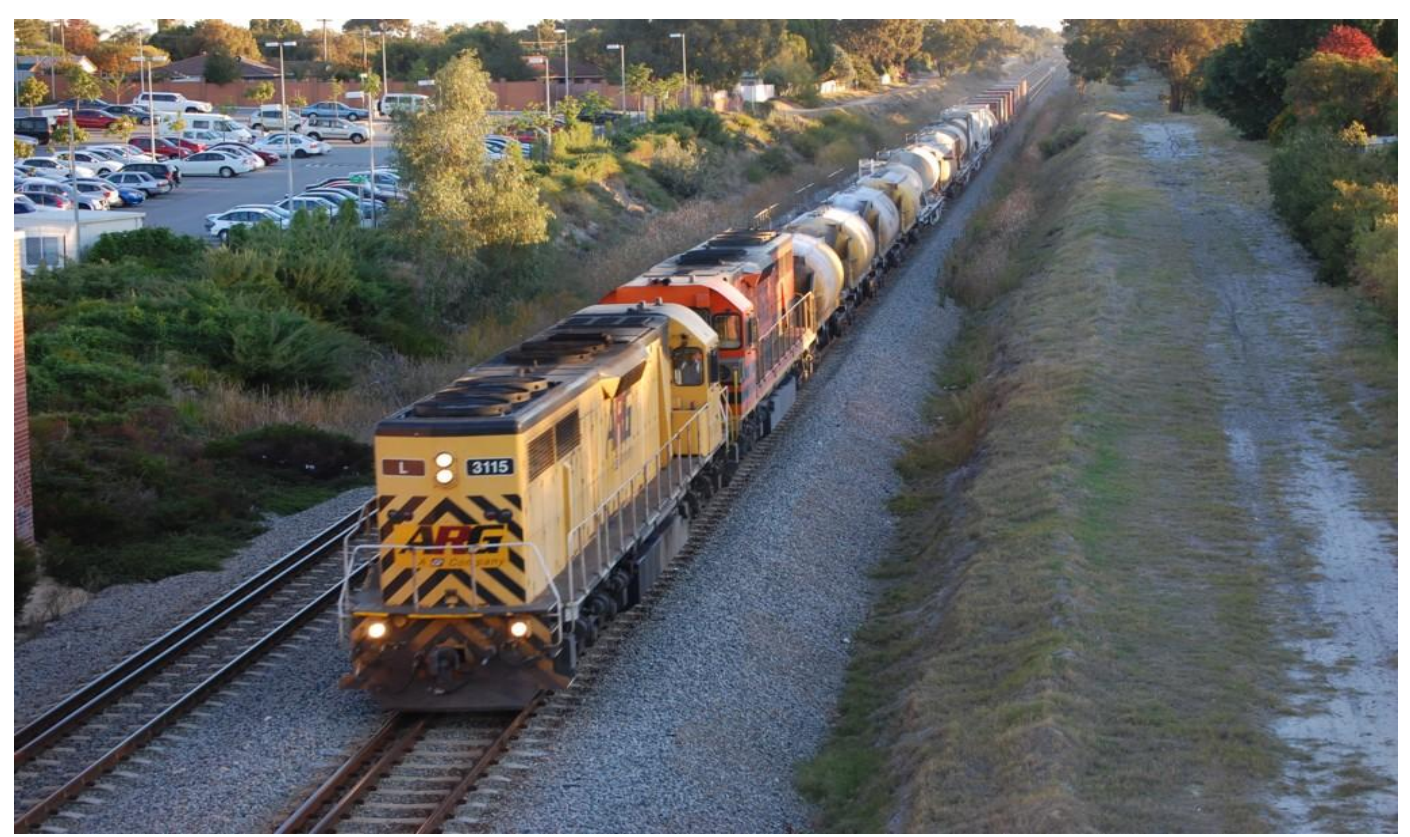
L3115 & LZ3107 cab to cab run 6197 cement lime and container train through Thornlie on May 29th, LZ3107 was being hauled dead attached from North Port Fremantle to Forrestfield.