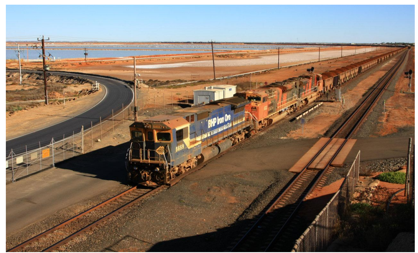
CM40-8M 5659, SD70MACe's 4332 & 4308 run 112 loaded Yandi cars towards Redbank Bridge Port Hedland on October 1st.