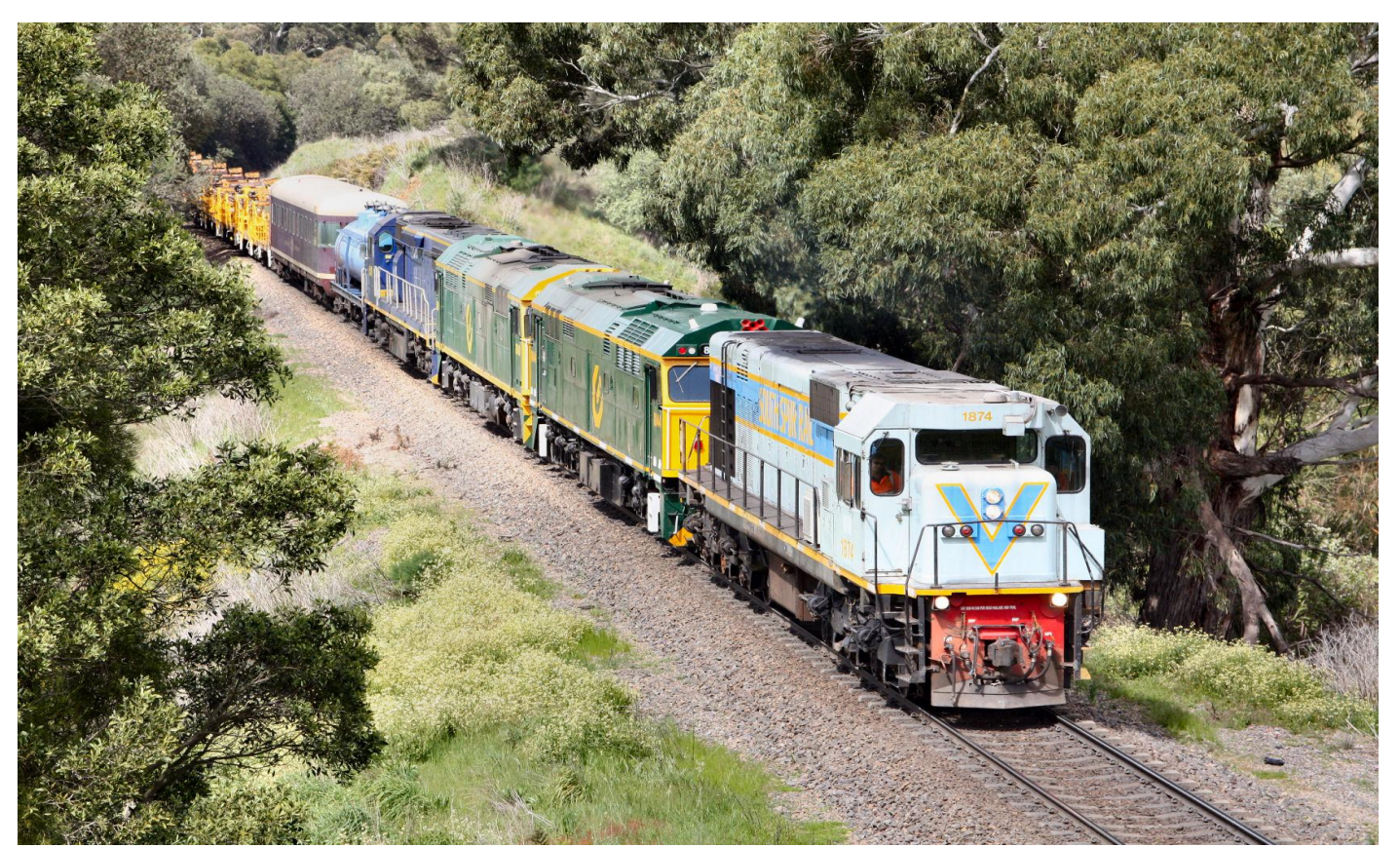
1874 last locomotive remaining in old South Spur blue livery copy of an old WAGR colour scheme runs 5MR2 rail train with 8044, 8049 & C508 through Yantaringa SA on September 24th.