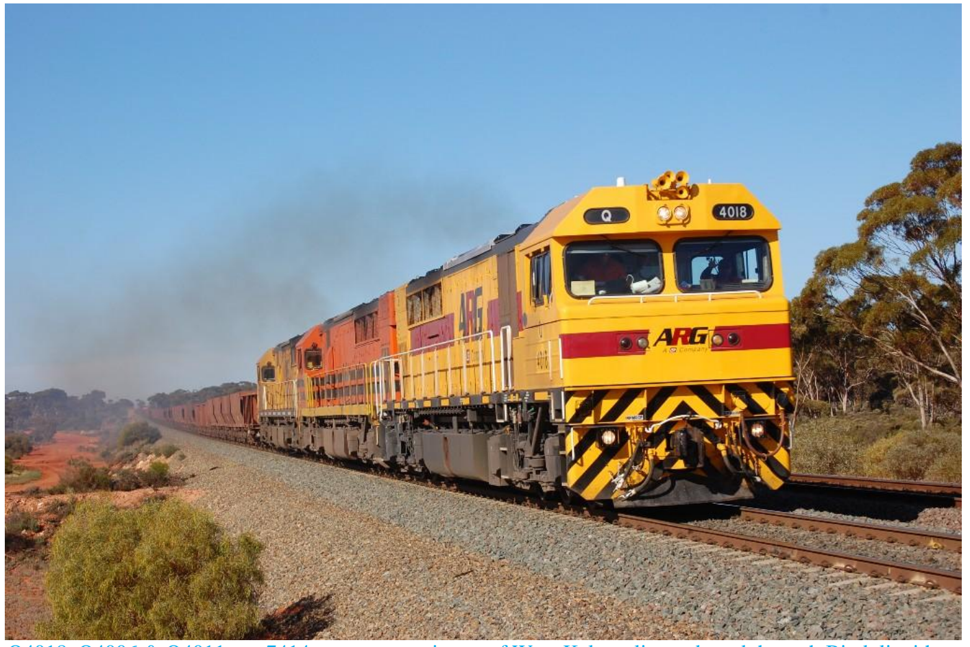
Q4018, Q4006 & Q4011 run 7414 empty ore train out of West Kalgoorlie yards and through Binduli with each Q class in one of the liveries the class has worn September 26th.