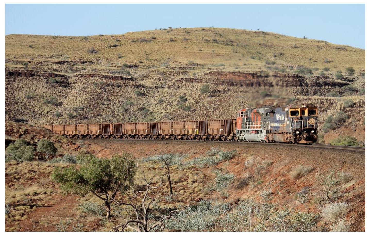
More of the greatest show on rail why here in Chichester Ranges it is the Holy Grail the ground shakes with their passing as 5660 & 4352 climb the grade at Garden on September 27th.