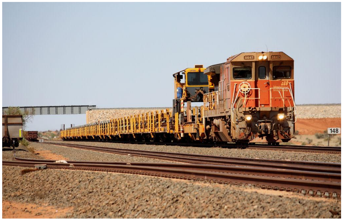
CM40-8M 5647 runs BHPBIO rail train through Woodstock as it passes under FMG flyover at 148km on Newman main line on September 27th.