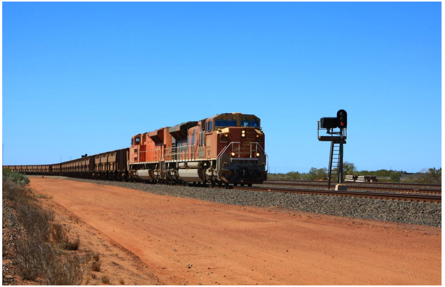
SD70MACe 4339 & 4329 run 112 empty ore cars around the Avoidance Road at Goldsworthy Junction to be made up at Bing into a larger train fro the run to the mines October 1st.