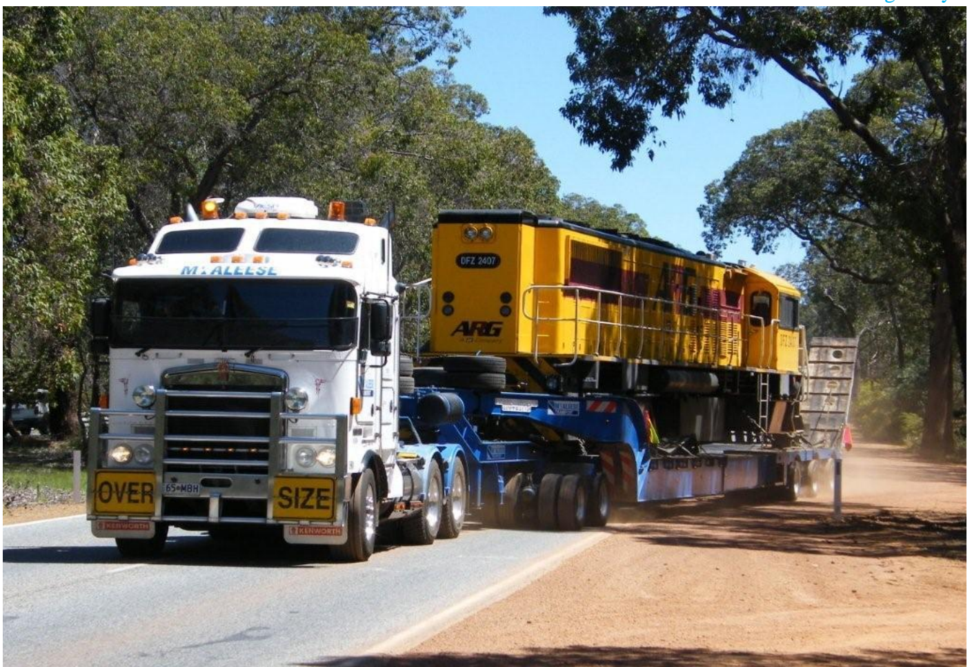
DFZ2407 ex QR2374 on low loader is hauled out of first truck bay on Great Eastern Highway on October 8th following cresting steep climb of Greenmount at commencement of its return to Qld.