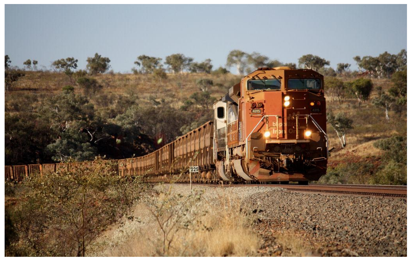
The greatest show on rail the accent of Chichester Range on BHPBIO Newman main line as SD70MACel/c 4315 & CM40-8M 5665 climb the grade at Hestsa on September 26th.