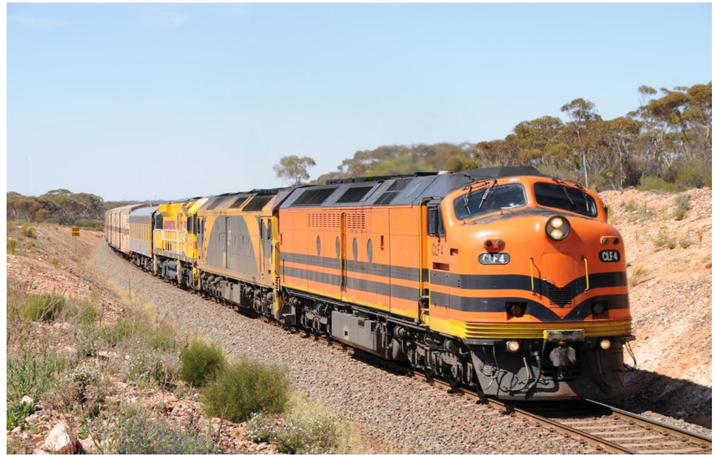
CLF4 & G534 haul dead AC4308 on its delivery run on 7AP1 QR National intermodal with SCT vans on lead as they enter the Binduli cutting west of Kalgoorlie on September 28th.

P2516 & NJ1602 ran 1306 empty woodchip wagons from Albany to Forrestfield to have wagons run through RailBam axle flaw detector at Millendon on September 27th. On arrival at Forrestfield NJ1602 was detached then taken to workshop for maintenance with P2516 running 1305 empty wagons back to Avon yard to stable. NJ1602 was attached behind P2504 on 6343 empty grain train at Forrestfield then hauled back to Avon on evening of October 2nd. DBZ2308, NJ1602 & DD2359 ran 7305 empty woodchip wagons back to Albany on October 3rd to resume woodchip services on 5th.