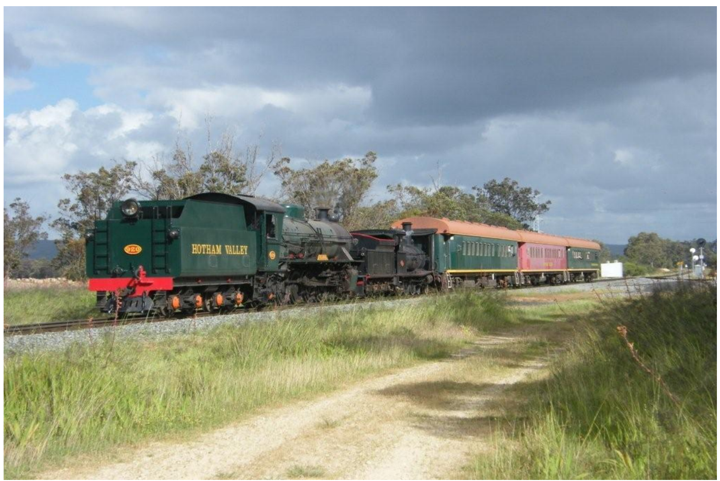
W920 and G123 both tender first run 4H12 steam special from Dwellingup October 28th the final few km Alumina Junction to Pinjarra on WestNet Rail track on last steam run of 2009 season.