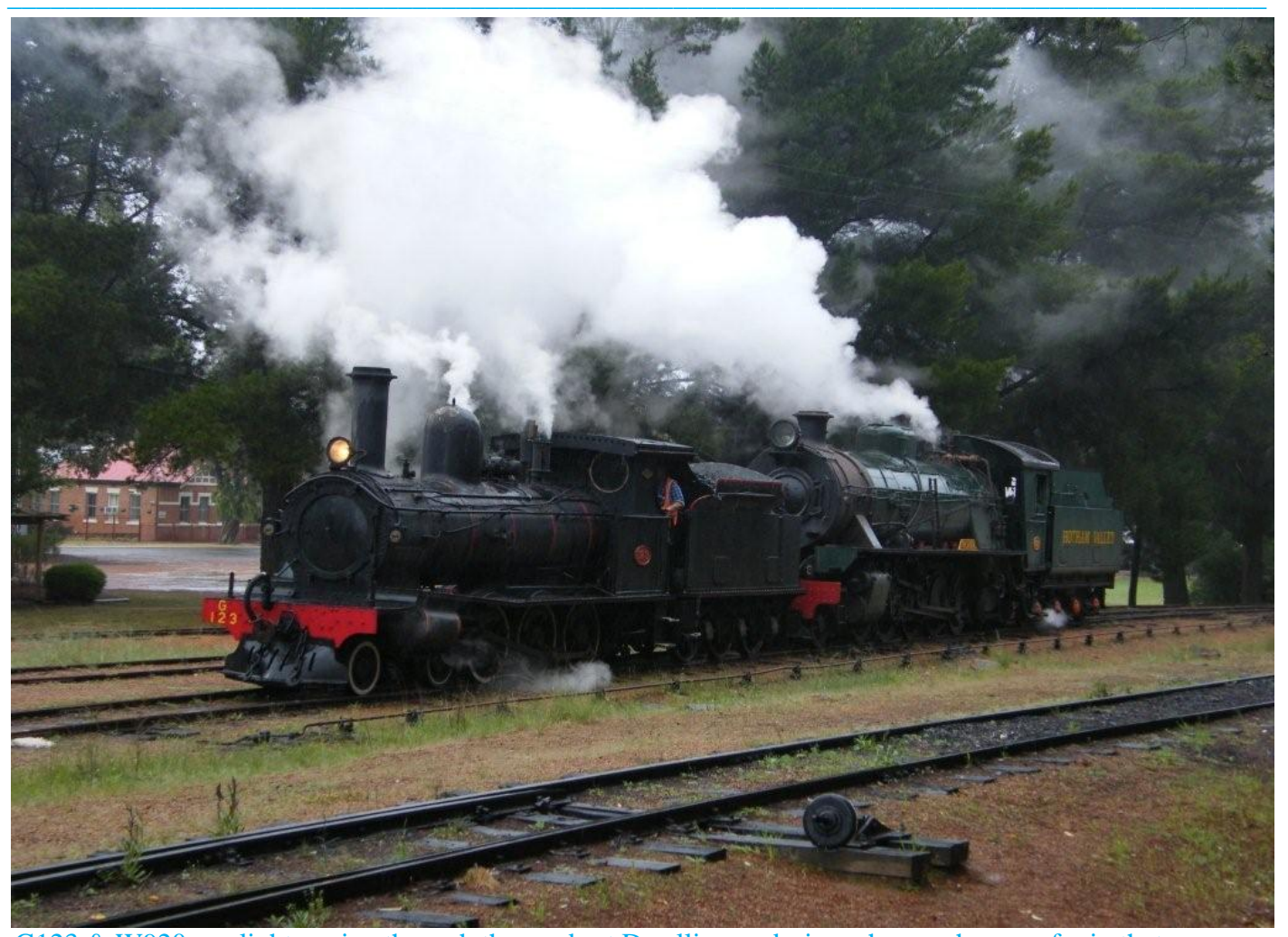
G123 & W920 run light engine through the yards at Dwellingup during a heavy shower of rain that causes the locomotives to give off an impressive steam show on October 28th.

P2507 & P2516 are running the grain train into Albany since around October 19th replacing P2501 and P2515 that had ran the service following its resumption. DD2359 and NJ1602 are running woodchip service but DBZ2308 long end leading on west end and NJ1602 on east end ran it on October 19th.