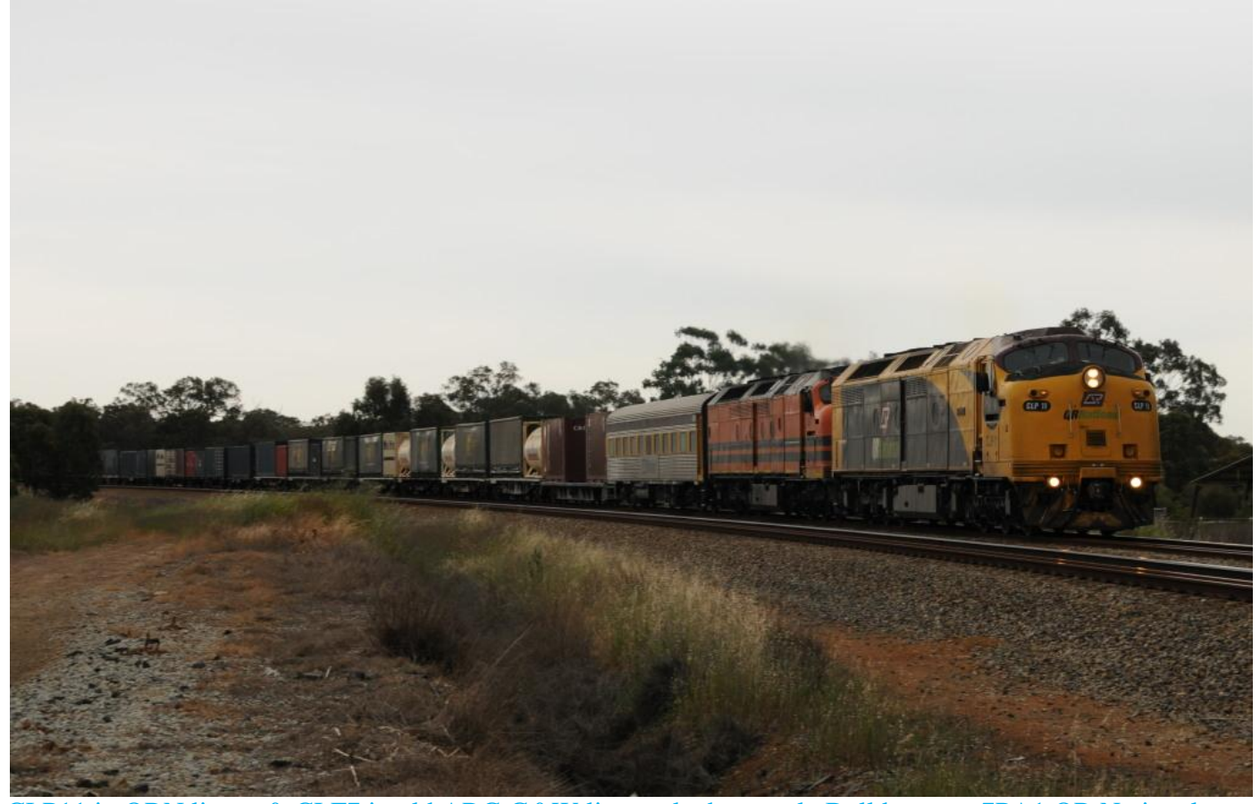
CLP11 in QRN livery & CLF7 in old ARG G&W livery elephant style Bulldogs run 7PA1 QR National intermodal through Hadrill Road Brigadoon on October 24th.