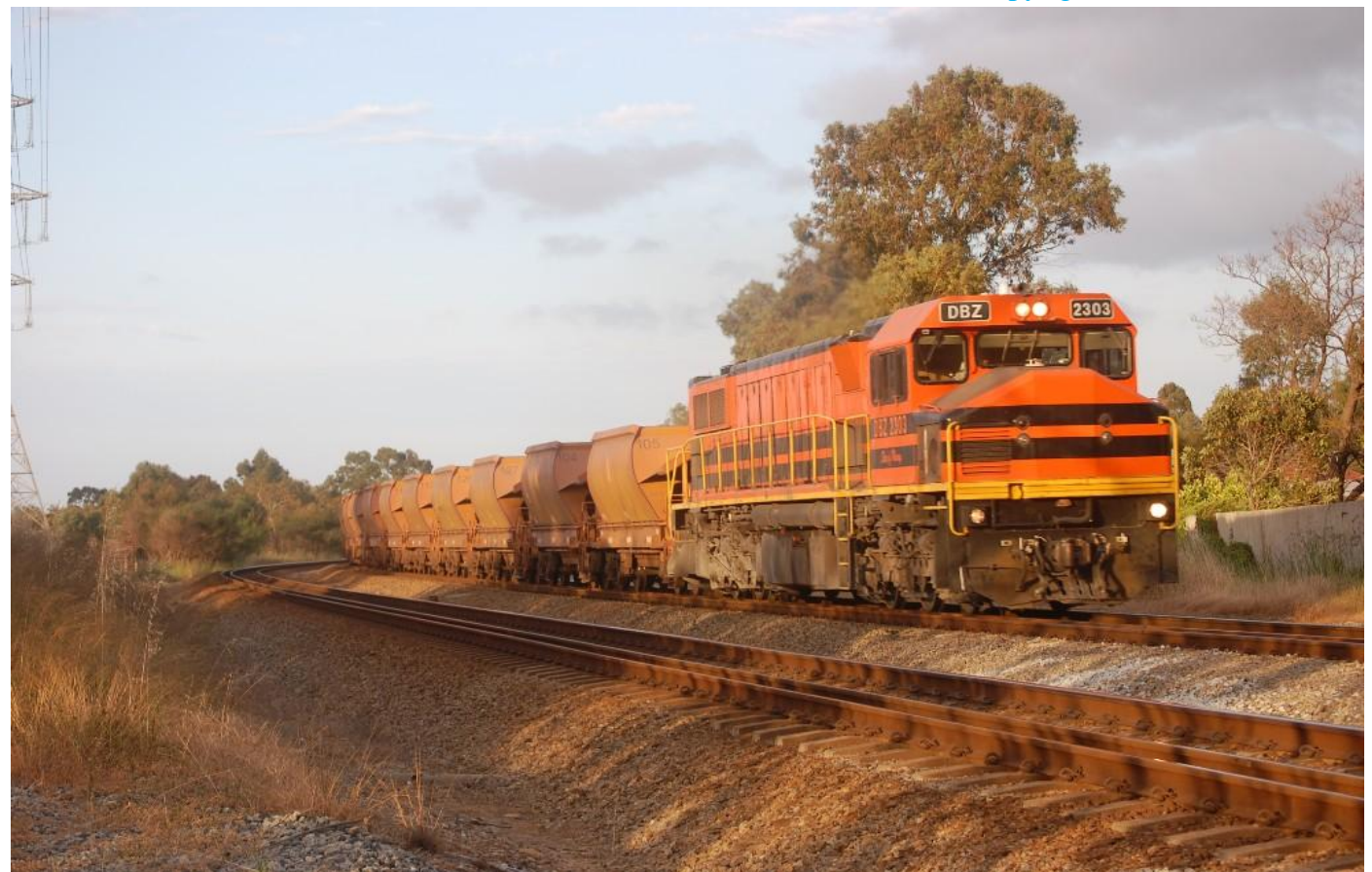
DBZ2303 runs the empty morning six days per week Bauxite Recourses service through Greenmount on its run to Mooliabeenee for another load of bauxite ore on October 24th. Photo Brendan Cherry

Issue fifty two November 2nd 2009 free electronic railway magazine number 52/09 West Australian railscene e-Mag is published weekly by Jim Bisdee on rail happenings on West Australian railroads <a href="https://www.westername.com">www.westername.com</a> Copyright Jim Bisdee © 2009