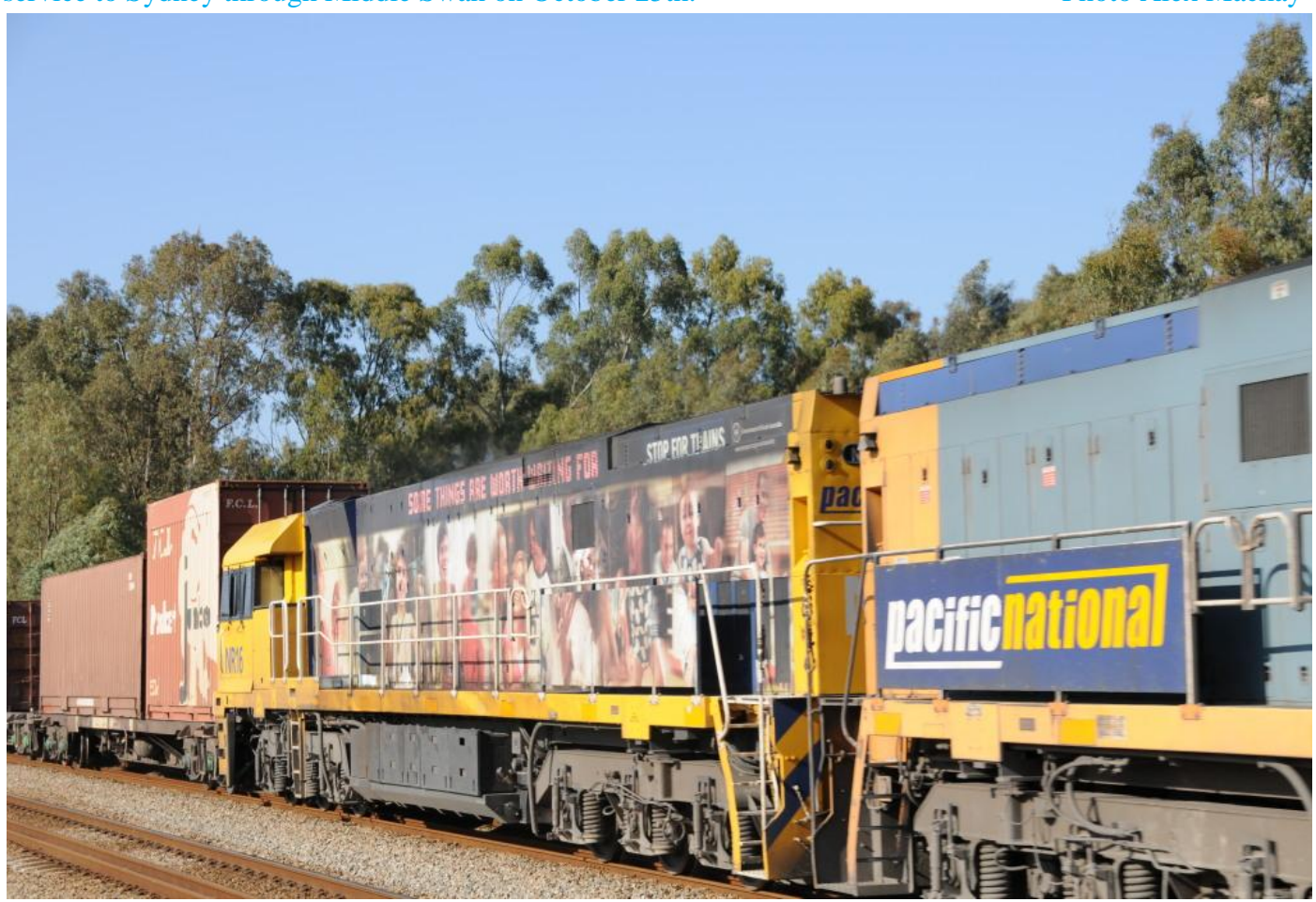
NR16 with the South Australian government's unique rail safety message on its side.