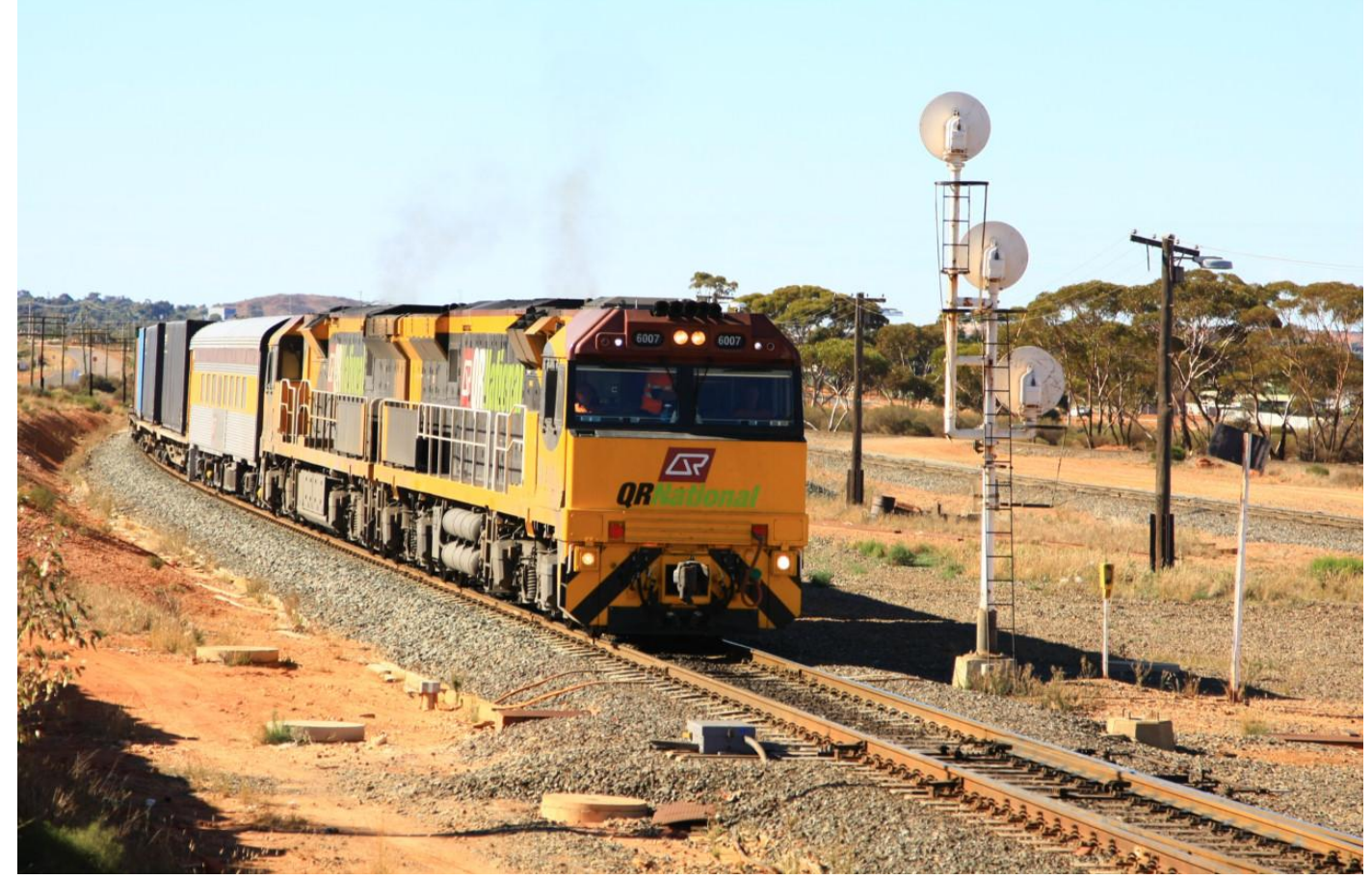
6007 & 6003 on 2MP1 QR National intermodal rounds the curve as it crests the grade at east end of West Kalgoorlie yard on June 2nd.