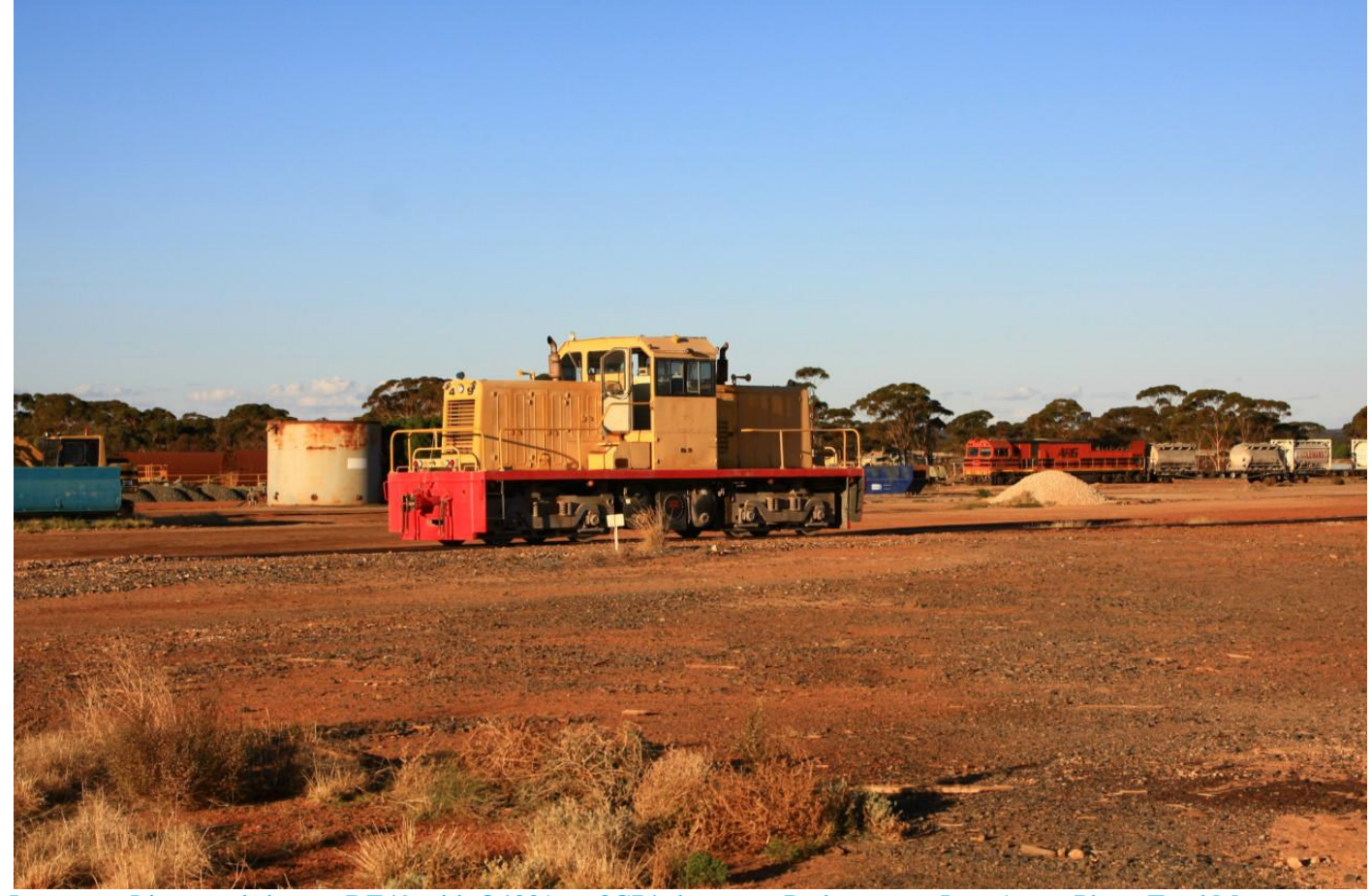
Loongana Lime yard shunter DE49 with Q4001 on 3C74 shunter at Parkeston on June 1st.