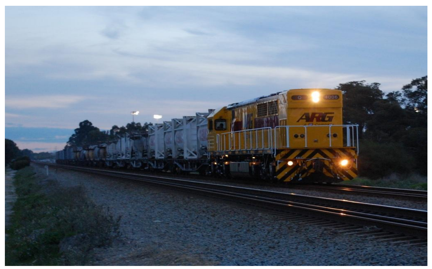
Q4006 just released following overhaul and repainting runs long end leading on 5197 combined lime, cement and container train through Thornlie on June 3rd.