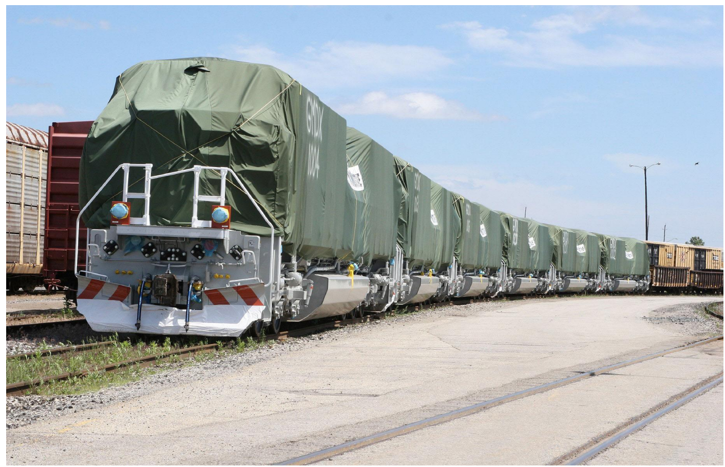
Six BHPBIO SD70MACe locomotives [4360, 4359, 4362, 4356, 4357 and 4358] for export through Montreal stored in MacMillan Yard on June 5th under tarps to protect them on the long voyage to Port Hedland.