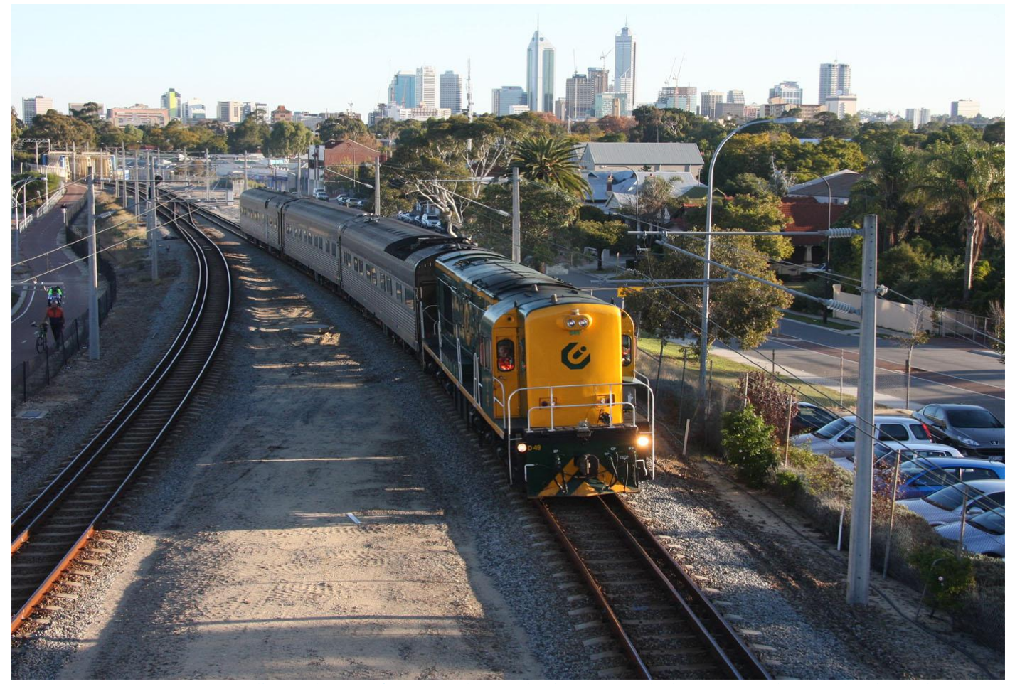
D49 runs 4C17 AK car recording train out of East Perth Terminal on June 9th that saw two locomotive hauled trains arrive and depart from the terminal on the one day for the first time in many years.