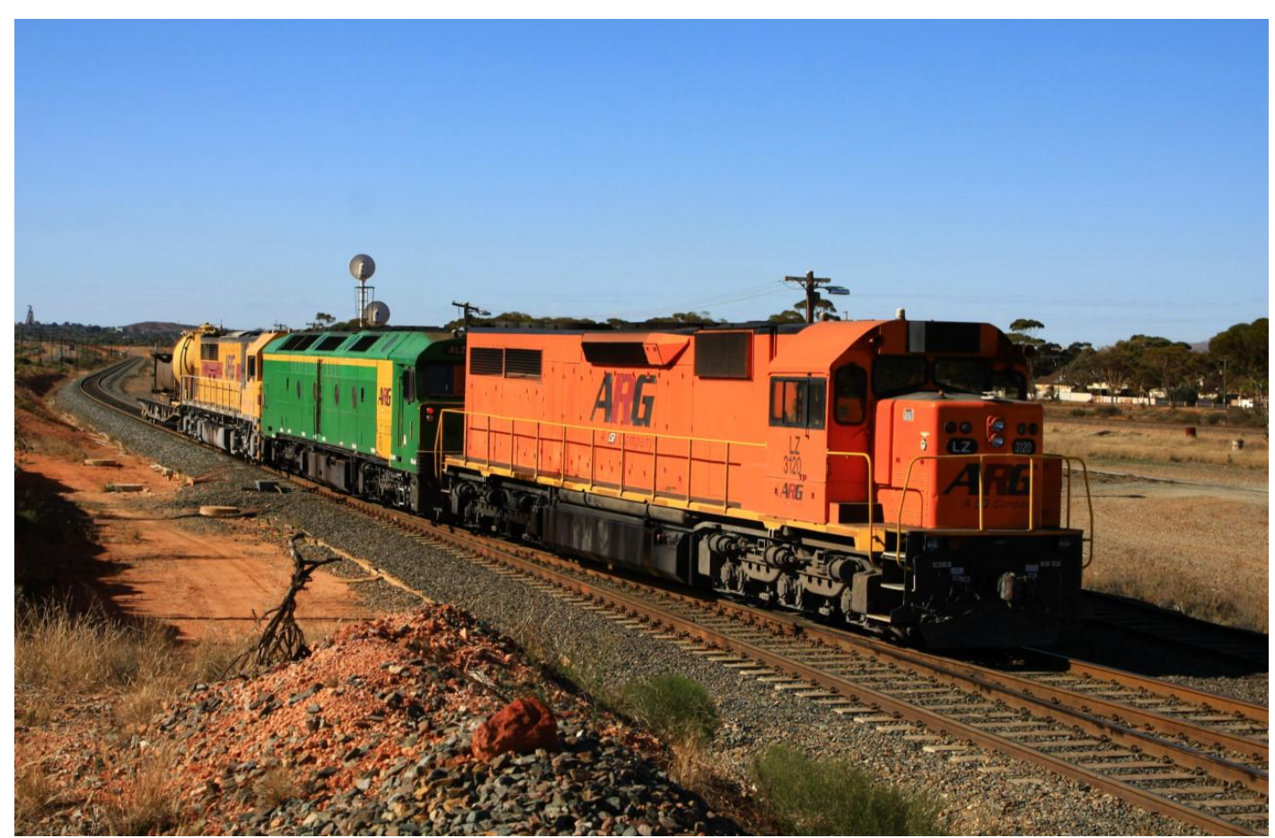
Three locomotives three different colours LZ3120, ALZ3208 & Q4014 with sand tanker/waste oil tanker enter West Kalgoorlie yard on June 2nd.