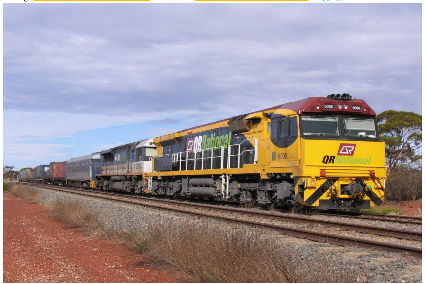
6008 & LDP002 on QR National intermodal 6MP1 waiting in crossing loop at Golden Ridge on June 6th to be bypassed by following Pacific National express service 7PM7.

Issue Eighty four June 14th 2001 free electronic railway magazine number 84/10 West Australian Railscene e-mag is published weekly by Jim Bisdee on rail happenings on West Australian Railroads E-Mag: WWW.WESTERNRAILS.COM Rail forum: http://Railswa.forumotion.co.uk Copyright Jim Bisdee © 2010