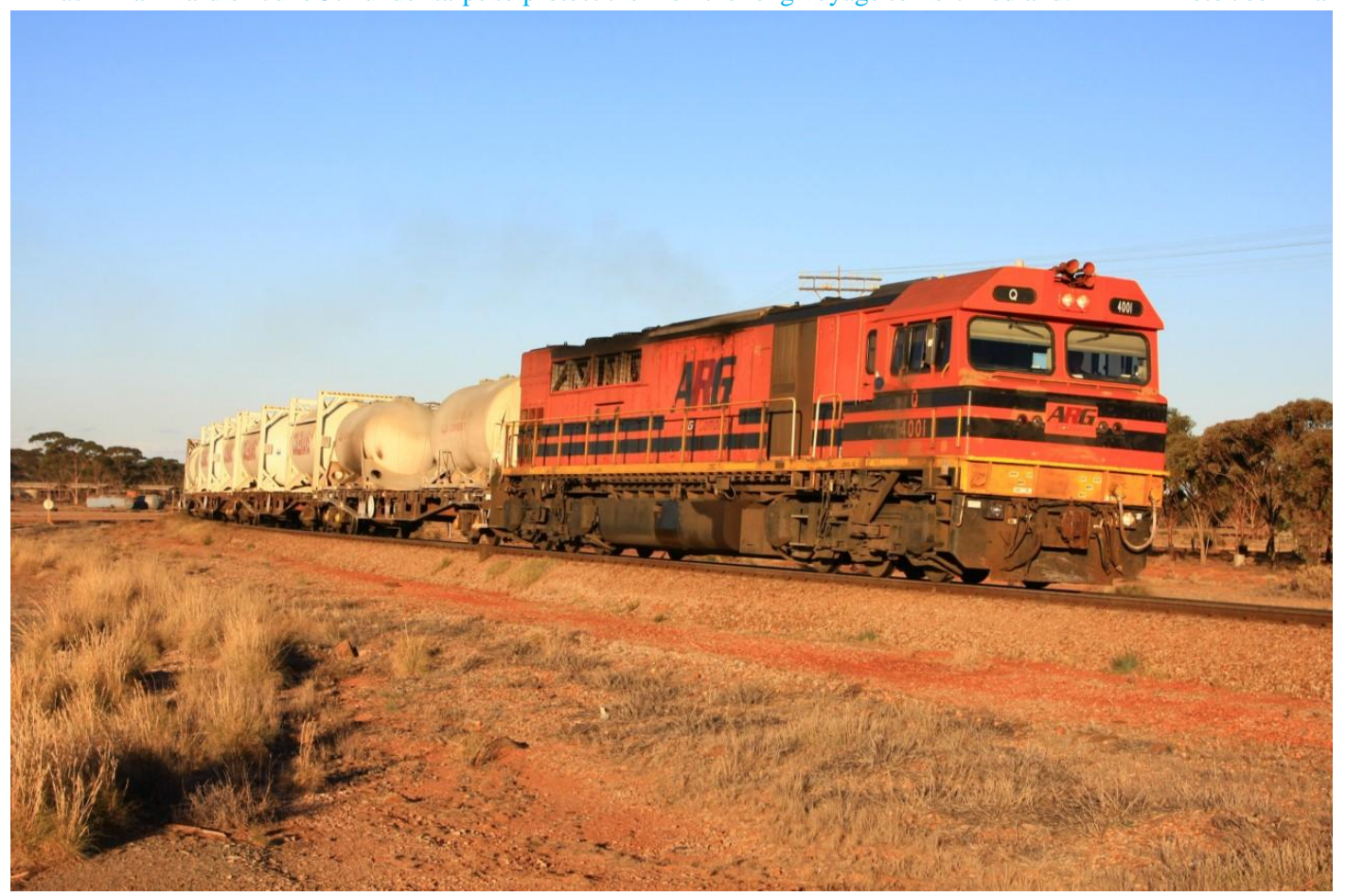
Q4001 runs 3C74 afternoon shunter returning from Parkeston to West Kalgoorlie with the empty cement and lime wagons from Loongana Lime yard on June 1st.