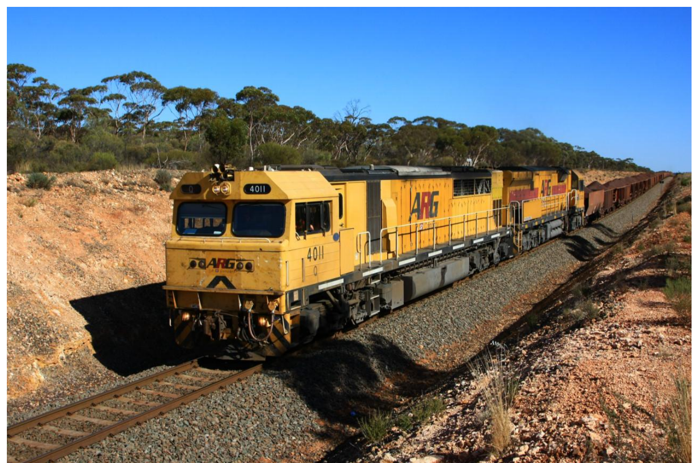
Q4011 & AC4305 on 2413 loaded iron ore train at 644km of Eastern Goldfields Railway descending grade through a cutting as it rolls towards Binduli and crew change June 2nd.

Wheat trains were withdrawn from Albany on May 24th to allow replacement of bridge north of Broomehill that was damaged by flooding on April 1st 2004. The old bridge was removed and a new bridge built in its place with work being completed by June 4th. Grain train commenced running into and out of Albany with the arrival of 6672 grain train worked by P2503, P2505 & DBZ2303 on June 5th.