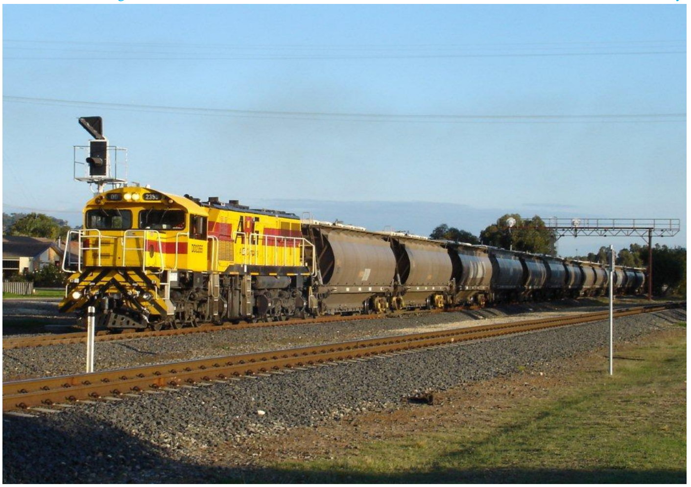
DD2355 runs empty Alcoa alumina train north through Brunswick on June 1st.