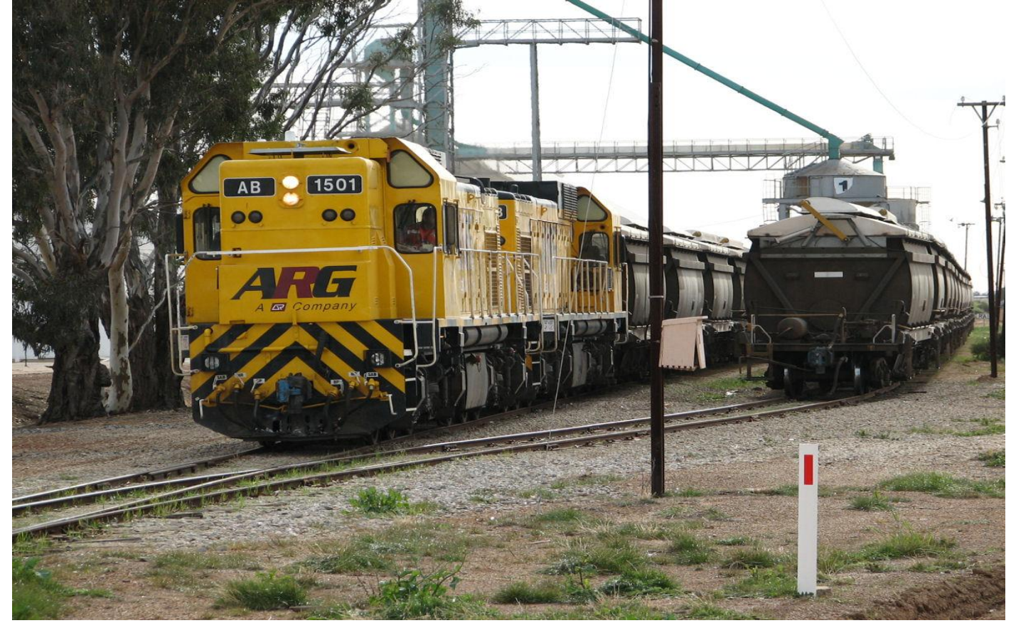
AB1501 & AB1503 on 5452 grain train loading at Narembeen on June 10th this is another tier three line whose future is in doubt.

S3302 still with the Westrail name on its side and in the old yellow livery runs bauxite train through Wellard crossing loop on May 28th.