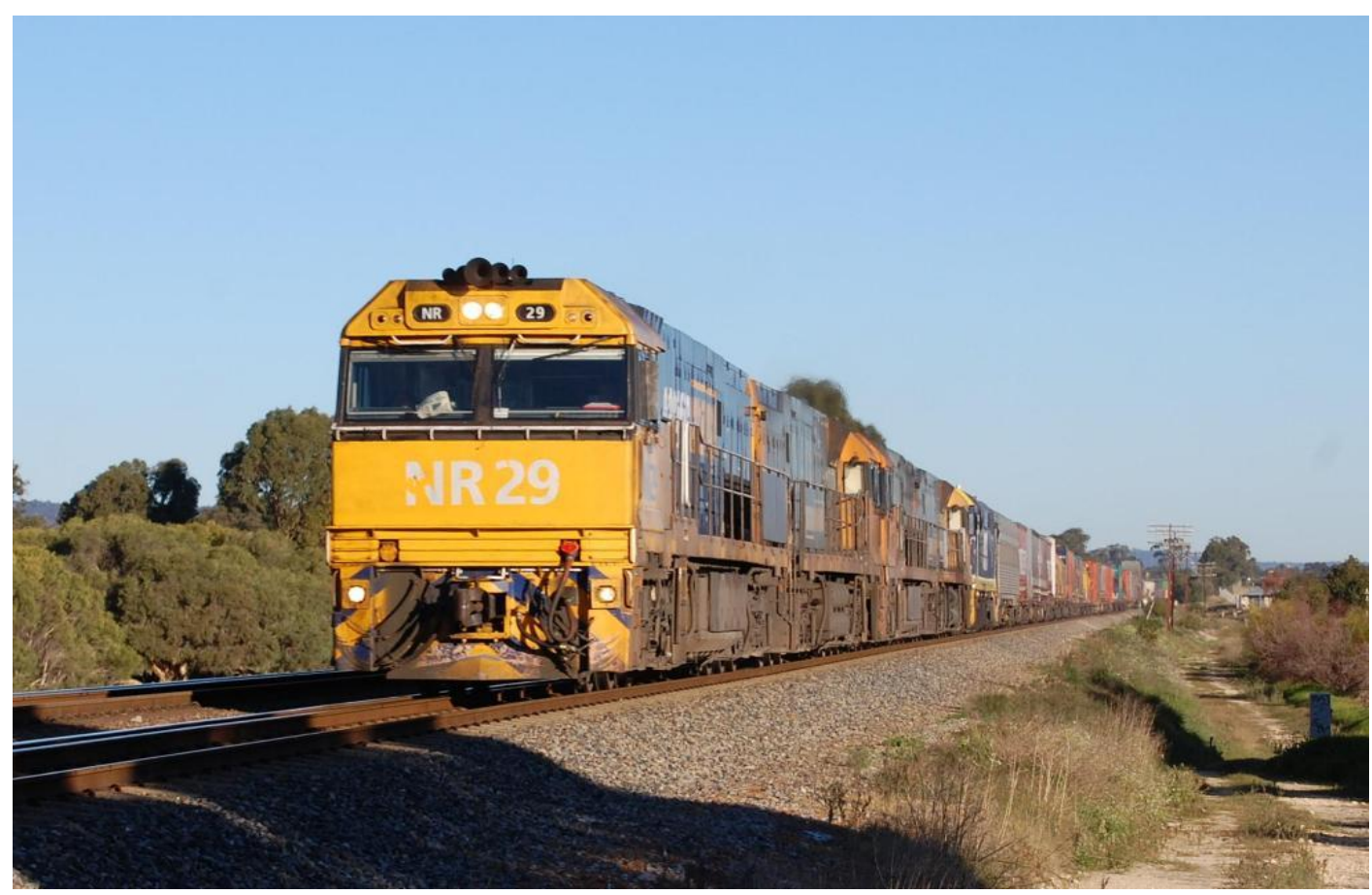
NR29, NR68, with dead attached NR79, NR18 & yard shunter 8039 being returned interstate for repair run 1PM5 through South Guildford on June 20th.