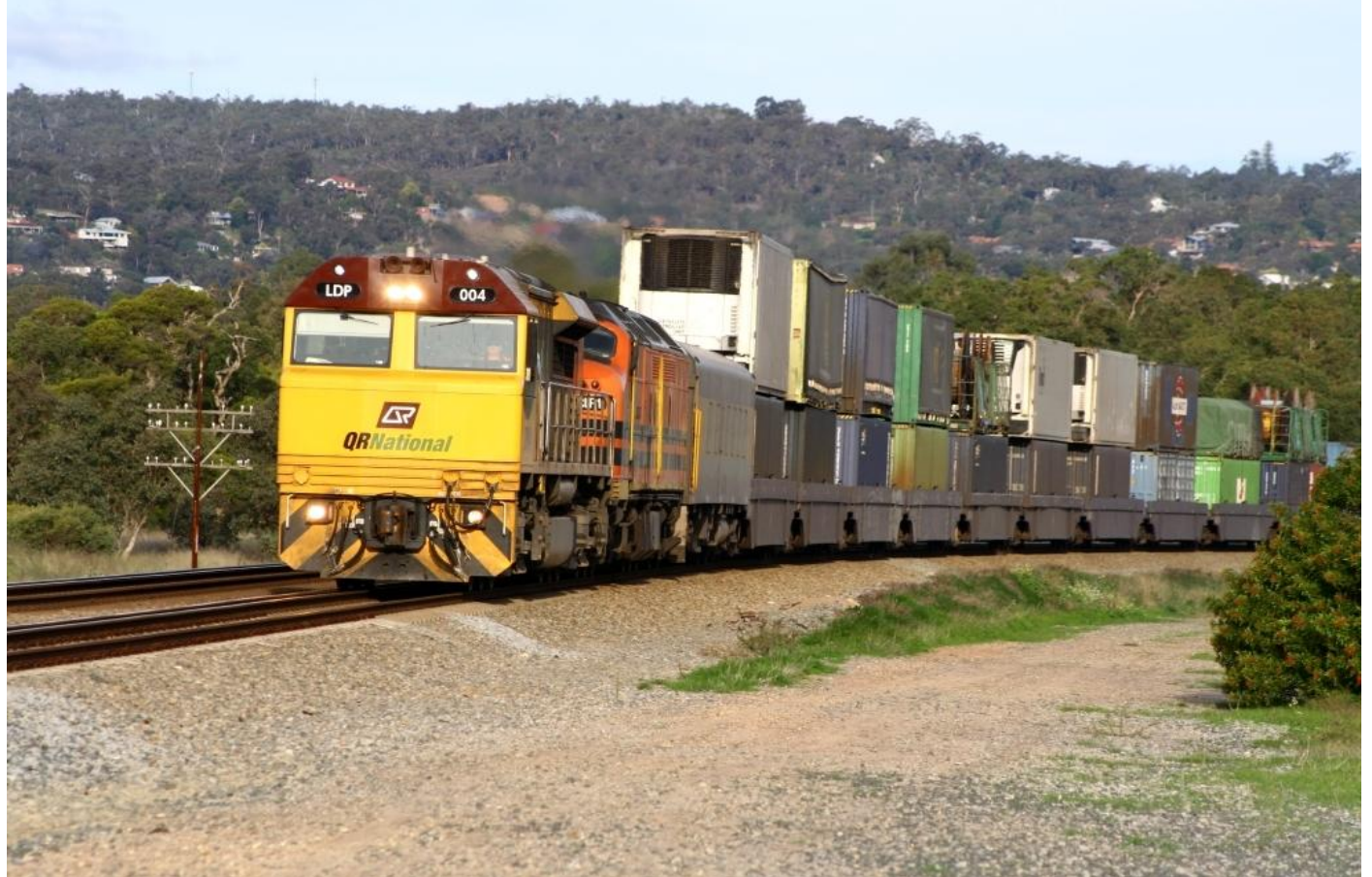
LDP004 & CLF1 runs QR National intermodal 7PM1 that has double stacking behind crew car round curve at Stratton at the entrance to Swan Valley on June 19th.

LDP004 and CLF1 ran 3PM1 and 7PM1 QR National intermodal services into Forrestfield on June 18th then out the following day. This was the first time a leased LDP locomotive had led a service onto or out of the QRN intermodal terminal in WA. LDP locomotives have been to Forrestfield before but as remote units.