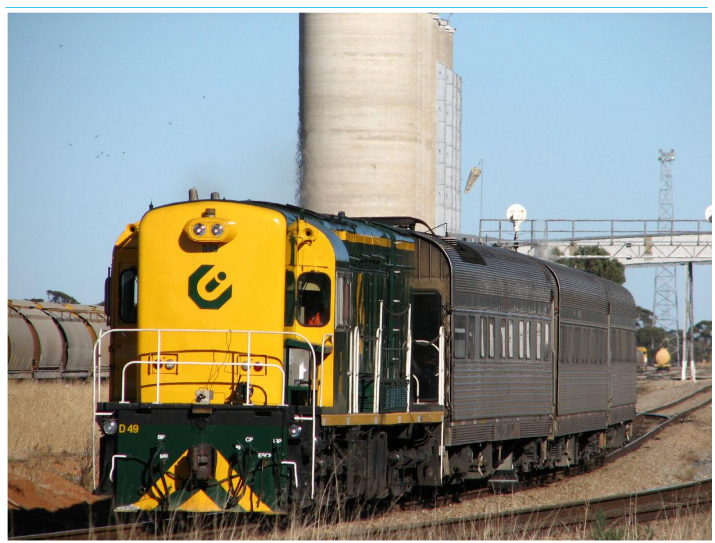
D49 runs 5C11 AK cars track recording train through West Merredin on June 10th.

B1603 is only a shell and was preserved at Military Markets in Midland that were destroyed by fire a couple of years ago. With the site now being redeveloped the locomotive is available for free but all removal and relocation costs must be met by the taker if there are no takers B1603 will be scrapped on site. Enquiries to luke.carne@bfpl.com.au