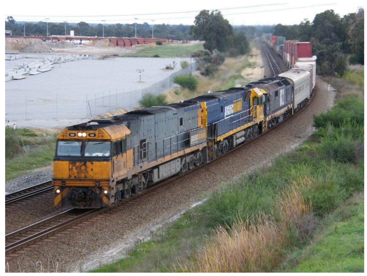
NR68, NR29 with dead attached 8122 on 5MP5 intermodal about to go under Kalamunda Road Bridge at South Guildford on June 20th.

DBZ2313 re-railed after derailing on loop at Yornaning ran 1376 light engine movement from Avon Yard to Forrestfield with AB1503 and AB1501 on June 27th.