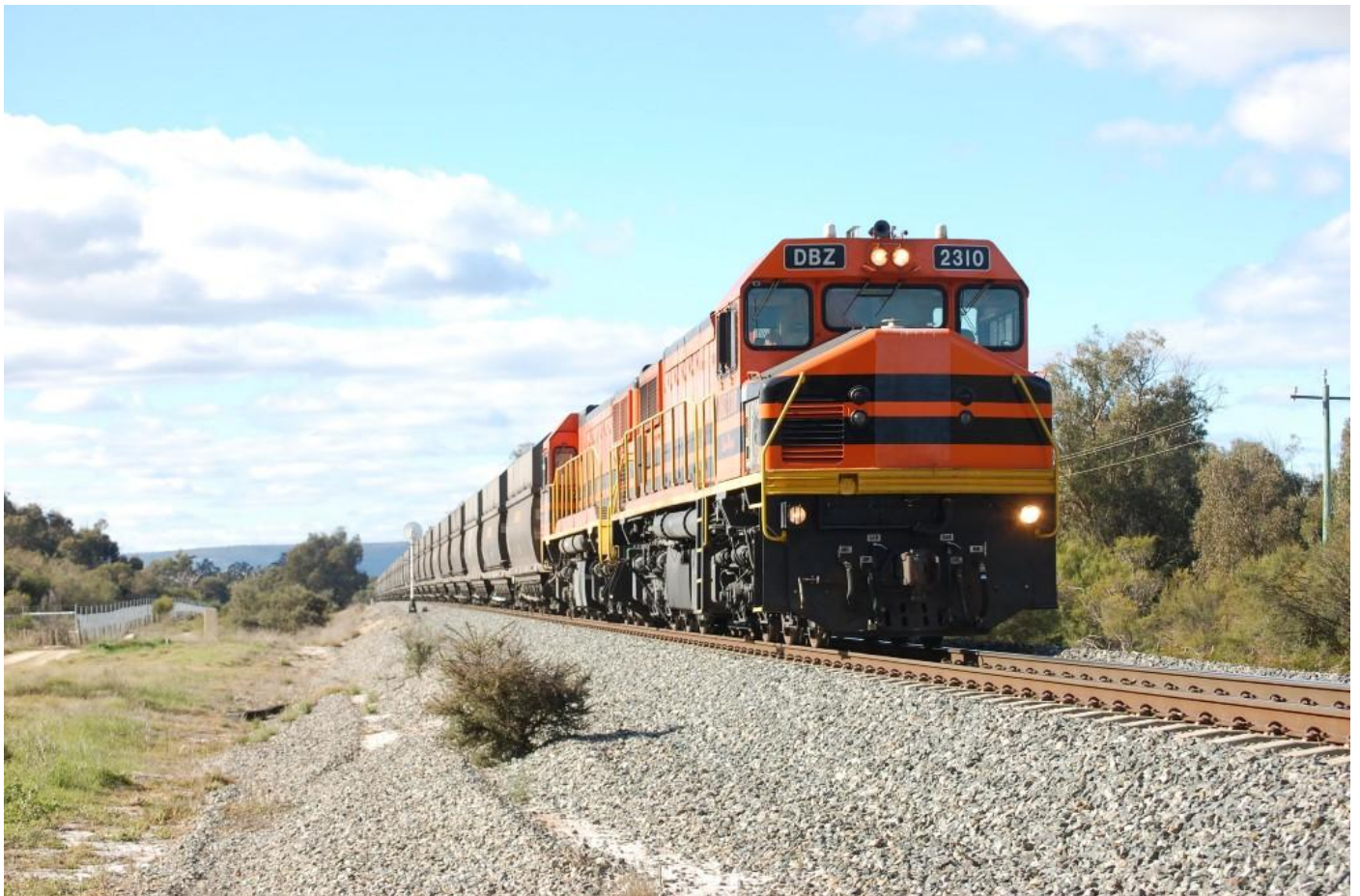
DFZ2310 & DAZ1905 on 1556 export coal train of QR wagons at Oakford July 4th.