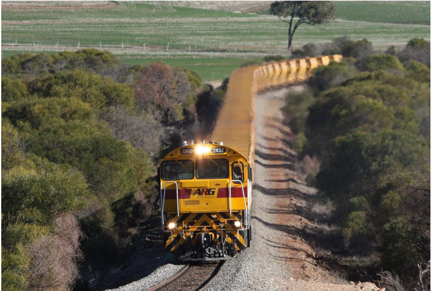
DFZ2407 & DFZ2405 on empty iron ore train to Ruvidini near Grants on July 3rd.