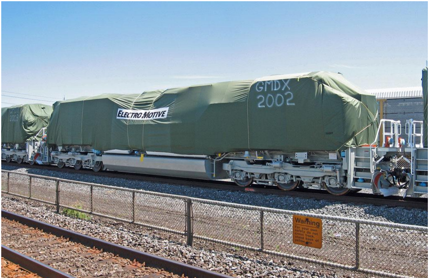
Side on view of GMDX2002 [BHPBIO #4368] at Oshawa Ontario July 3rd .