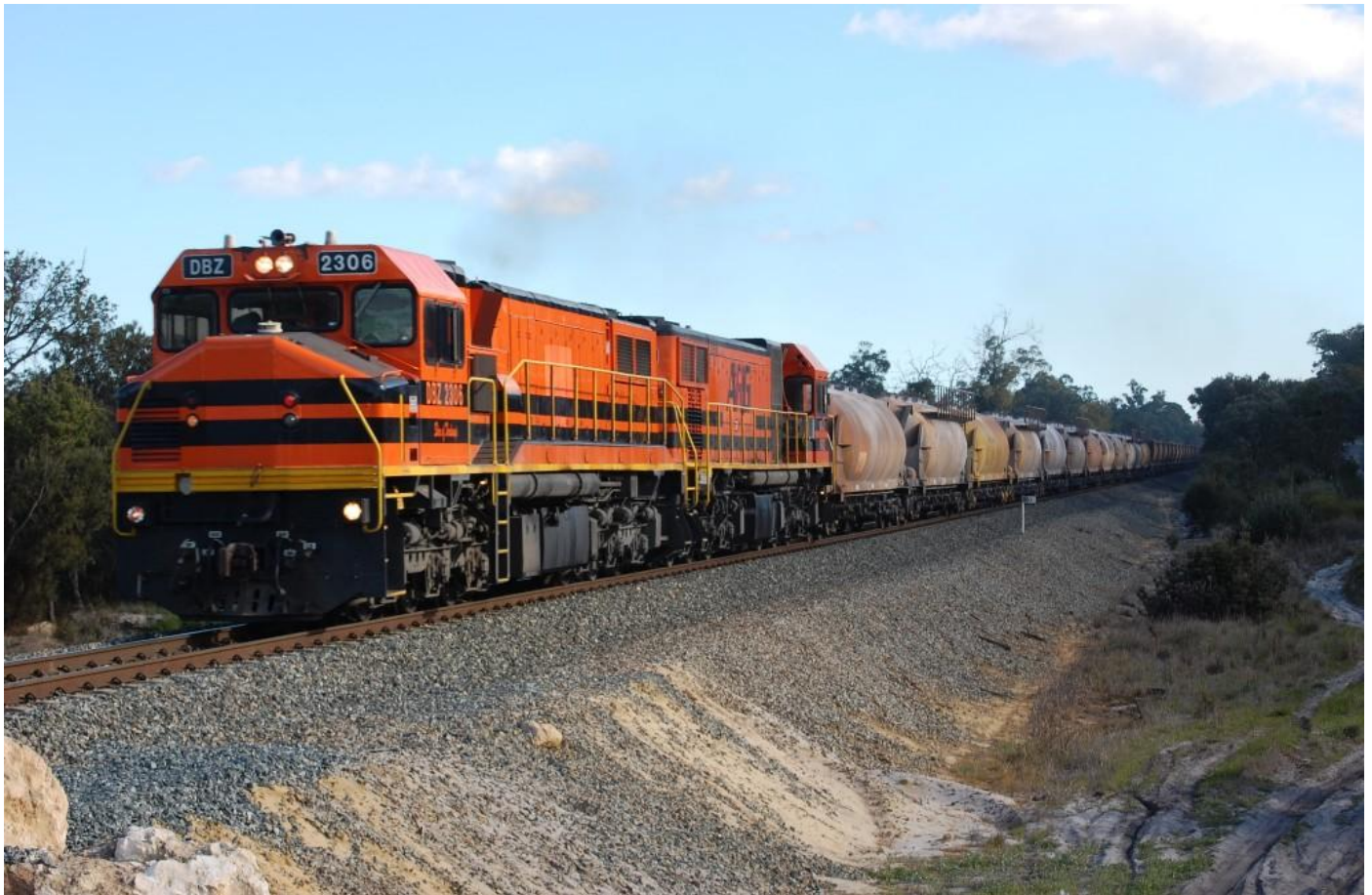
DBZ2306 & DAZ1902 on combined lime and empty coal train at Wellard July 4th.