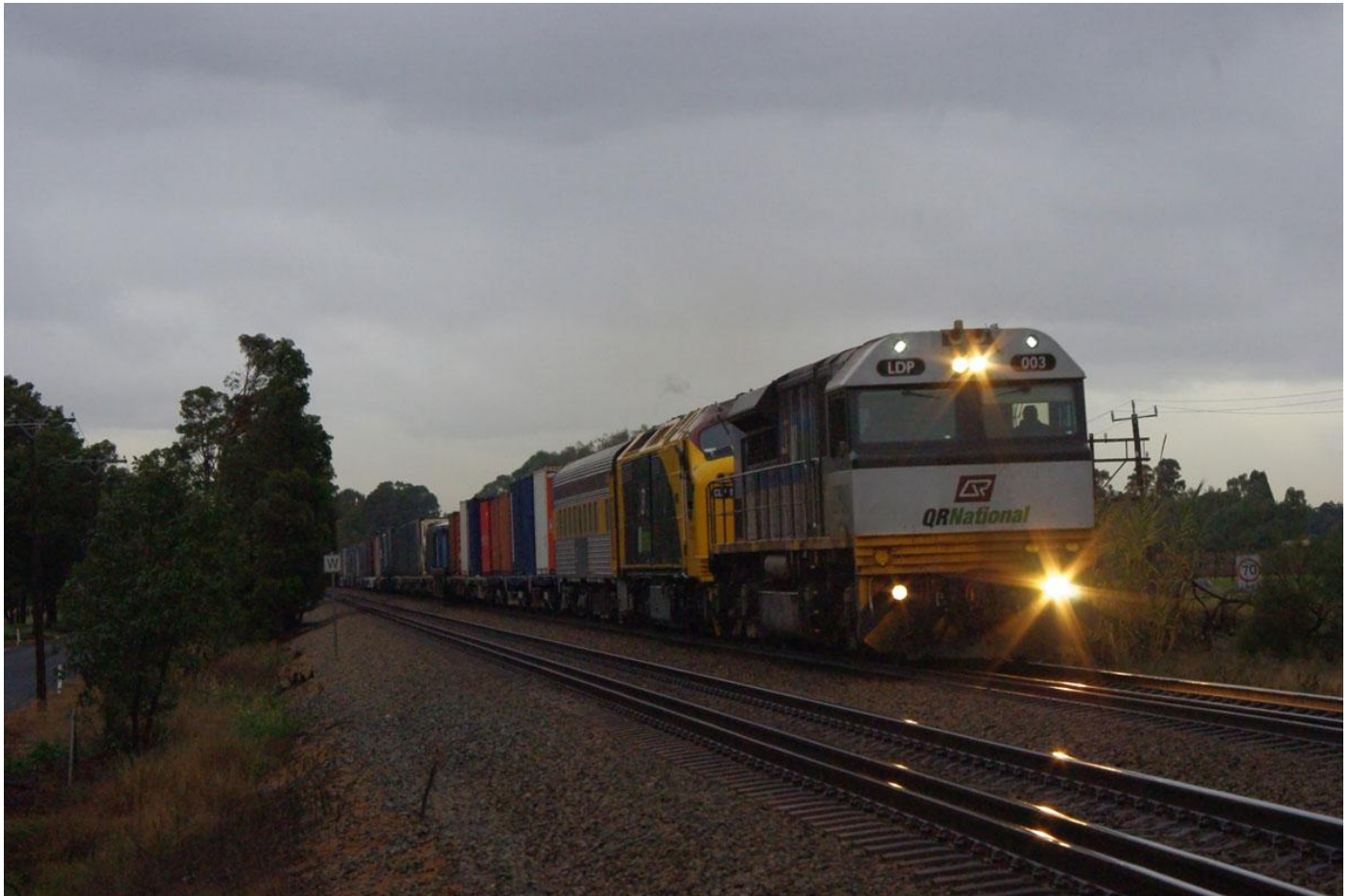
LDP003 & CLP13 on 6PM1 QRN intermodal in dark overcast Herne Hill on July 9th.

ZB2125 and ZB2129 that have not seen much use recently ran to Gemco Forrestfield for workshop attention on July 5th returning to SSRS/Gemco yard Bellevue on 8th.