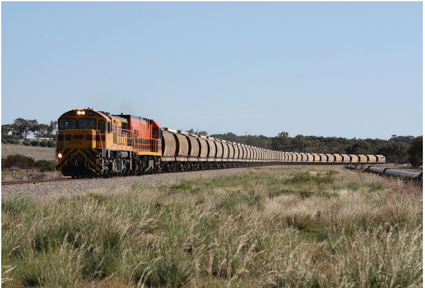
DFZ2406 & P2517 on empty grain to Mingenew at Bootenal on July 3rd.