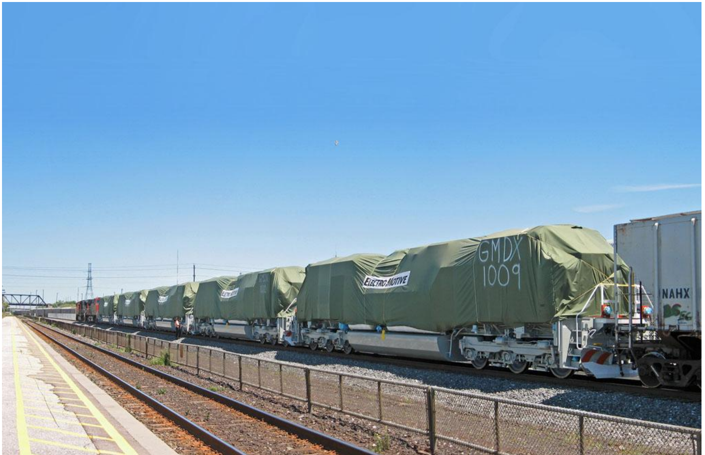
GMDX1009, GMDX1010, GMDX2001, GMDX2002 and GMDX2003 BHPBIO SD70MACe locomotives under tarps for export at Oshawa Ontario on July 3rd