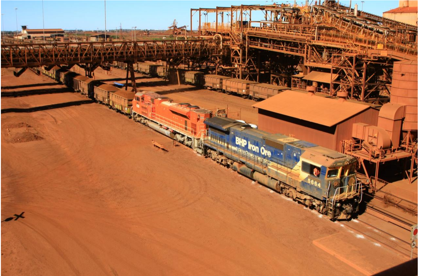
CM40-8M 5664 & SD70MACe 4328 approach car dumper one at Nelson Point on May 8th 2010 with load of Yandi fines to dump.

I selected all the photos for this special edition I have not used any of my own photos for I felt I could be open to bias. This is a selection of about 500 photos that have been published over the past 21 months and I hope you enjoy them. Jim Bisdee publisher West Australian Railscene e-Mag.