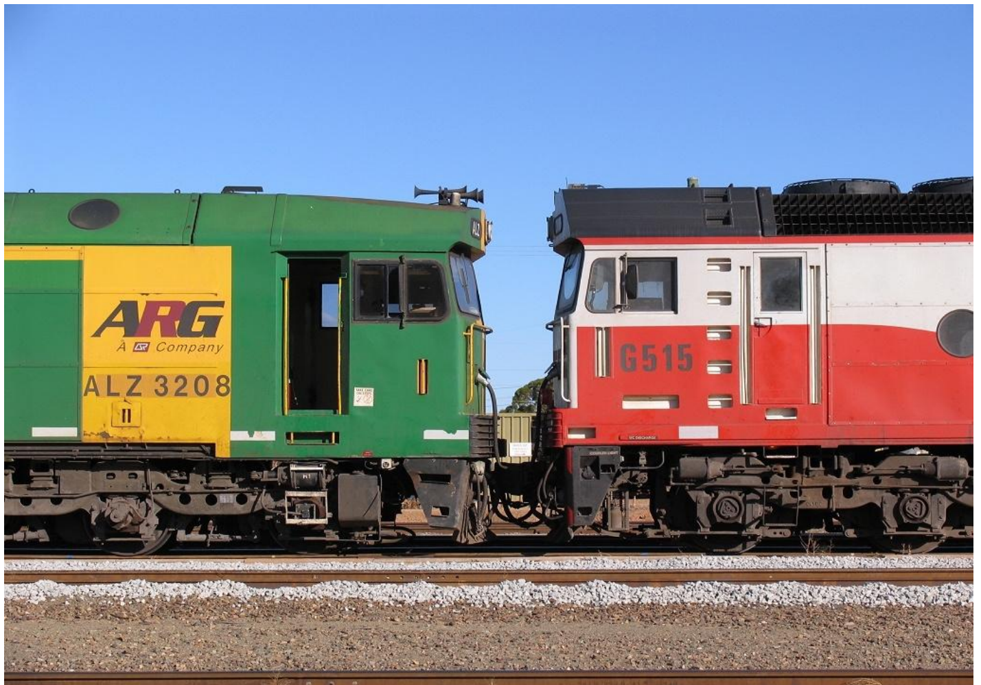
ALZ3208 & G515 coupled in West Kalgoorlie yards March 26th 2009.