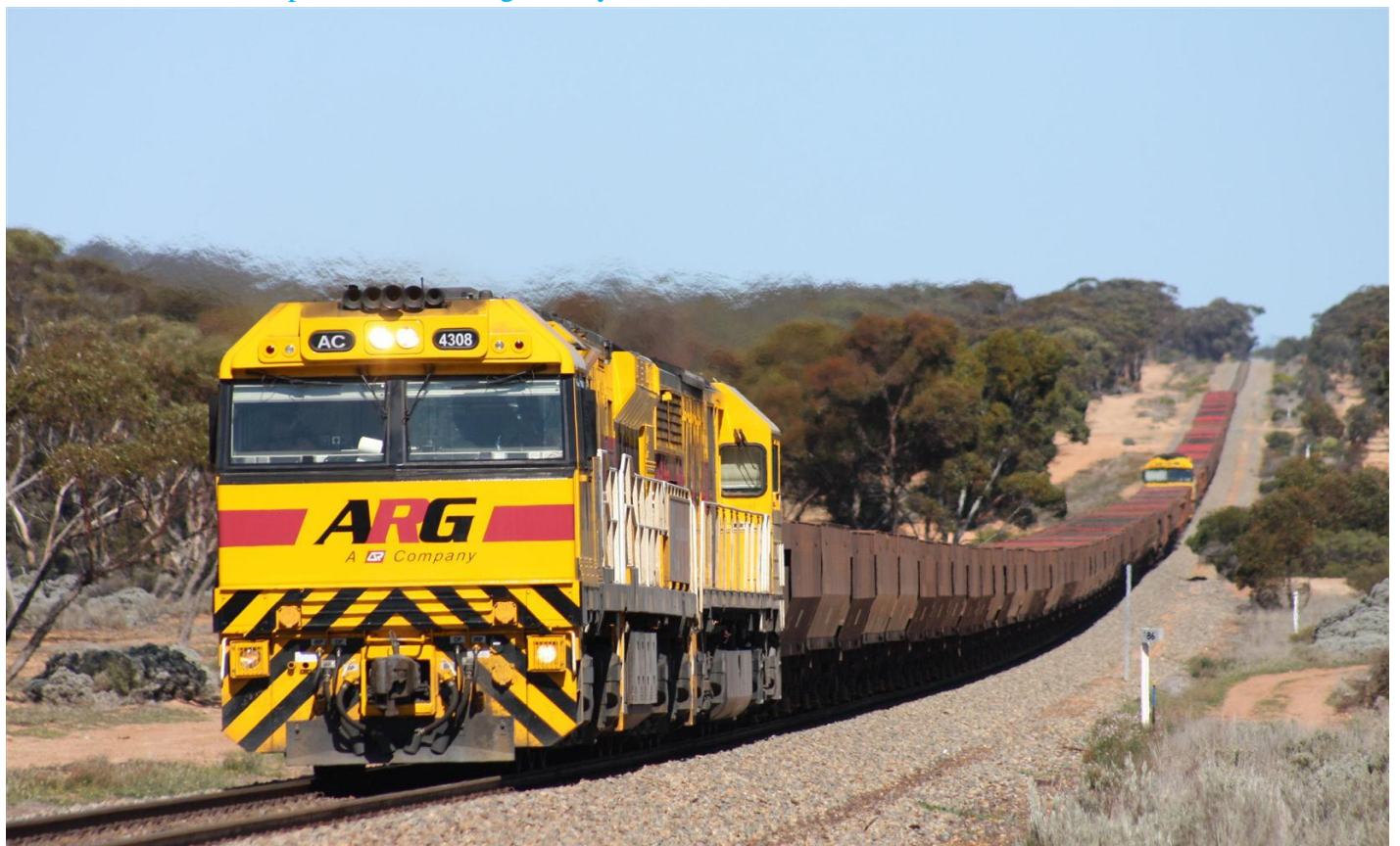
AC4308, Q4019 with AC4302 run empty DPU ore train Norseman on August 27th 2010.