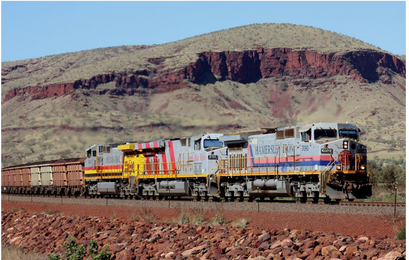
Hamersley Iron CW44-9W 7090 in original livery, ES44ACi 8133 in tiger stripe livery and CW44-9W grey and yellow Pilbara Iron livery run loaded ore train at Rosella North on July 7th 2009.