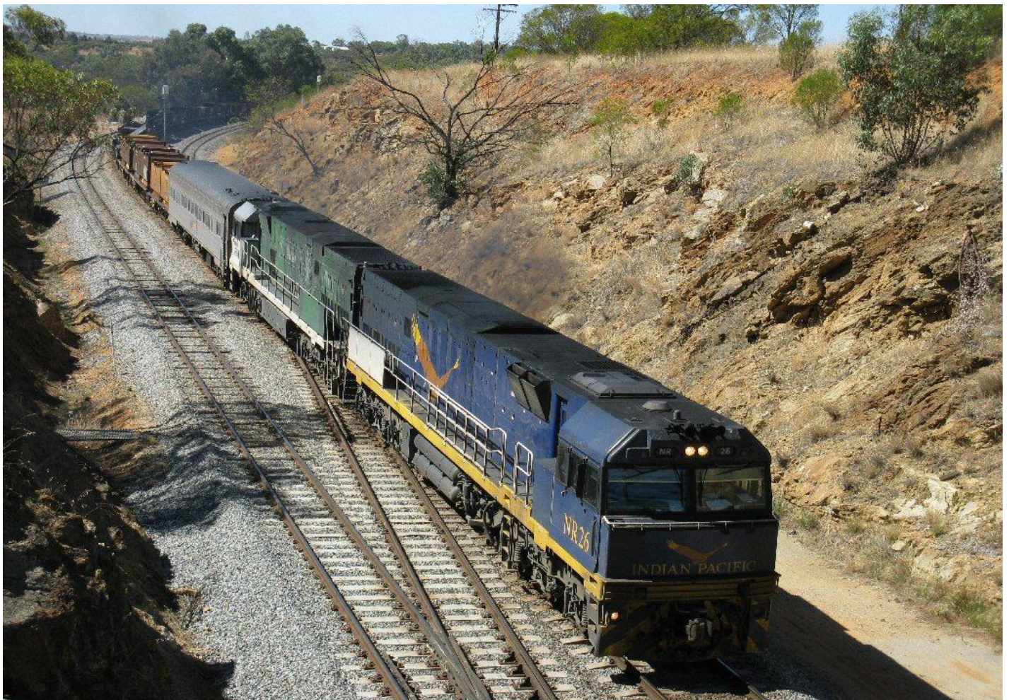
NR26 & NR85 run 4WP2 steel train at Northam on March 28th 2010.