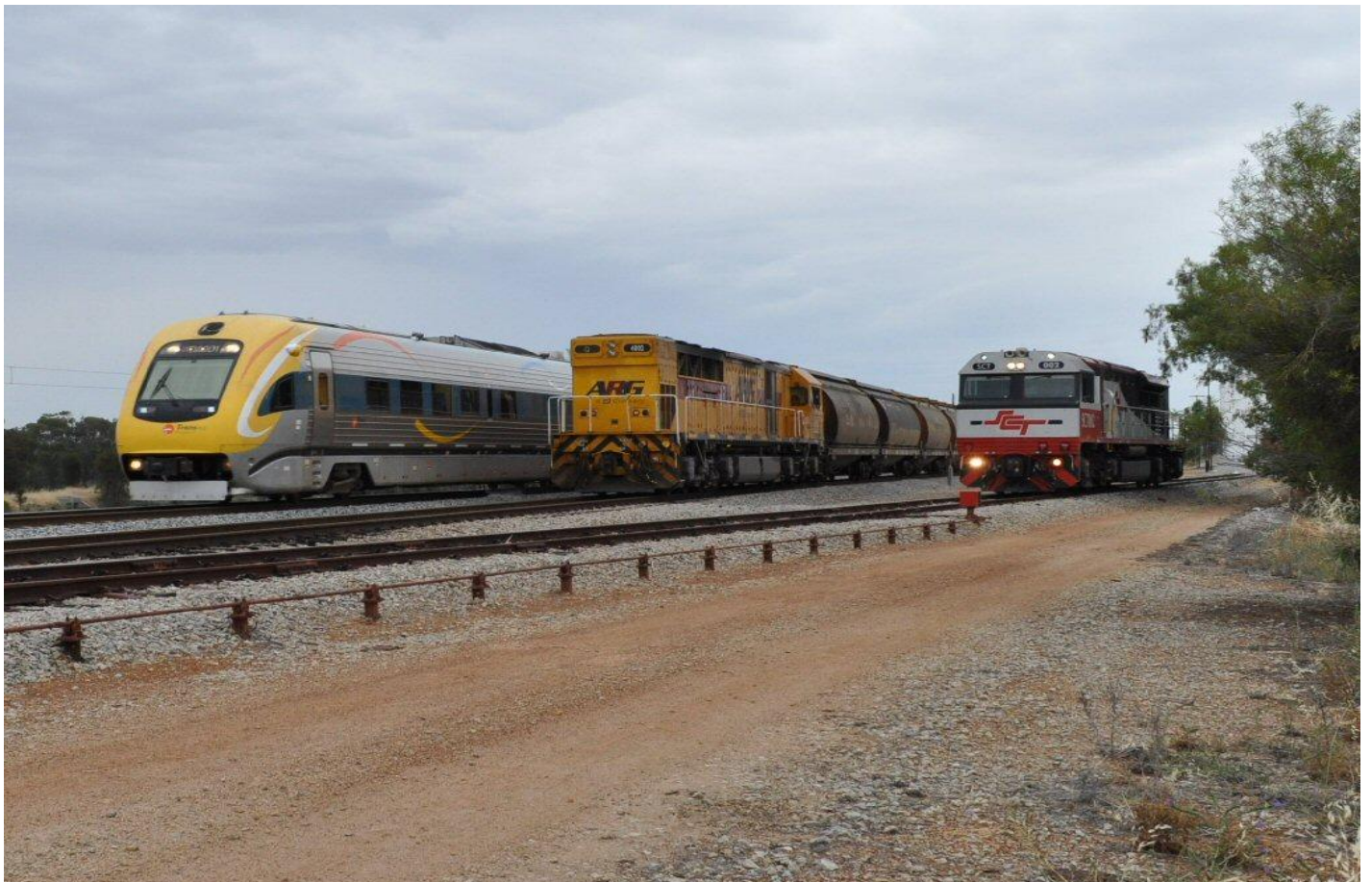
PTA Kalgoorlie Prospector service by passing ARG Q4002 on 6055 empty grain, SCT locomotive SCT002 at Meckering on November 12th 2009 three different items, three different owners.