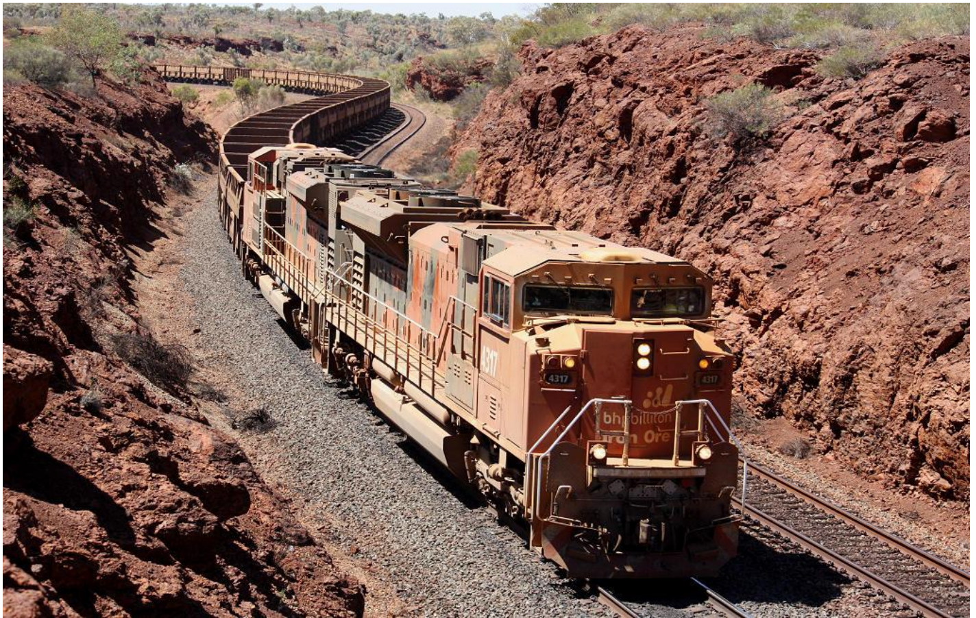
SD70MACe/c 4317 & 4323 run empty ore train round the curves at Hester as it climbs the grade through the Chichester Ranges on September 28th 2009.