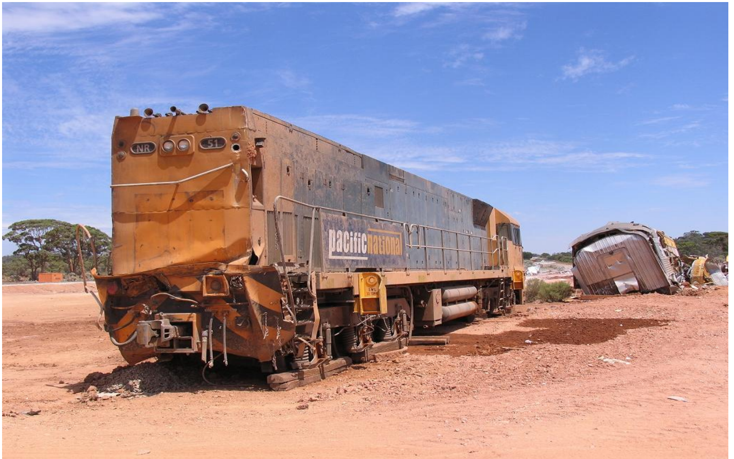
NR51 wrecked in the Curtin derailment with wrecked crew car RZAY289 still on site February 15th 2009 with locomotive to be eventually repaired while crew car was scrapped.