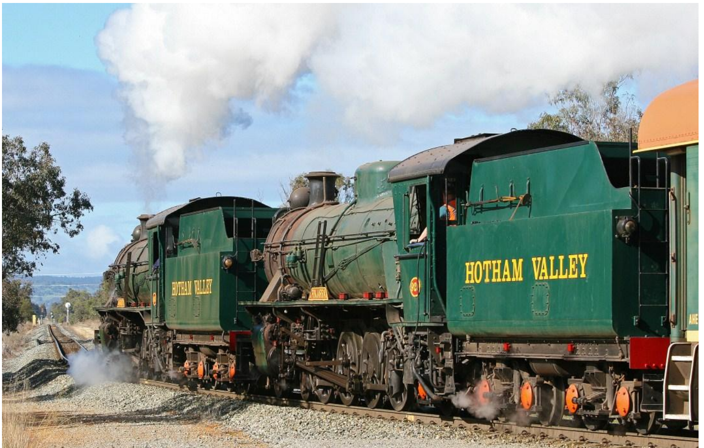
Steam locomotives W903 & W920 approaching Alumina Junction July 18th 2010.