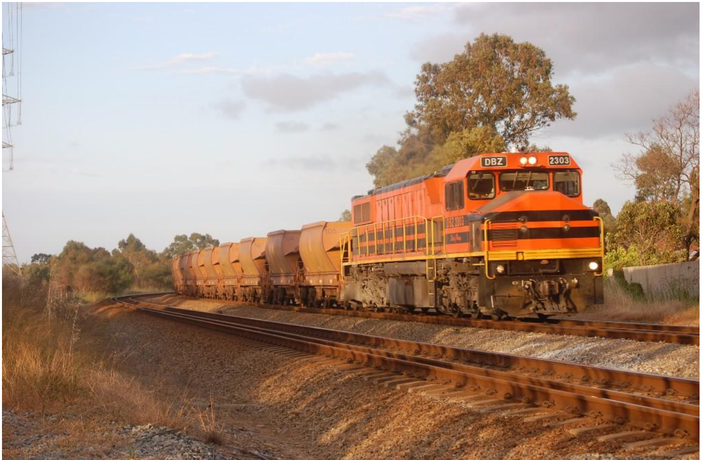
DBZ2303 on 7741 empty bauxite train at Greenmount on October 24th 2009.