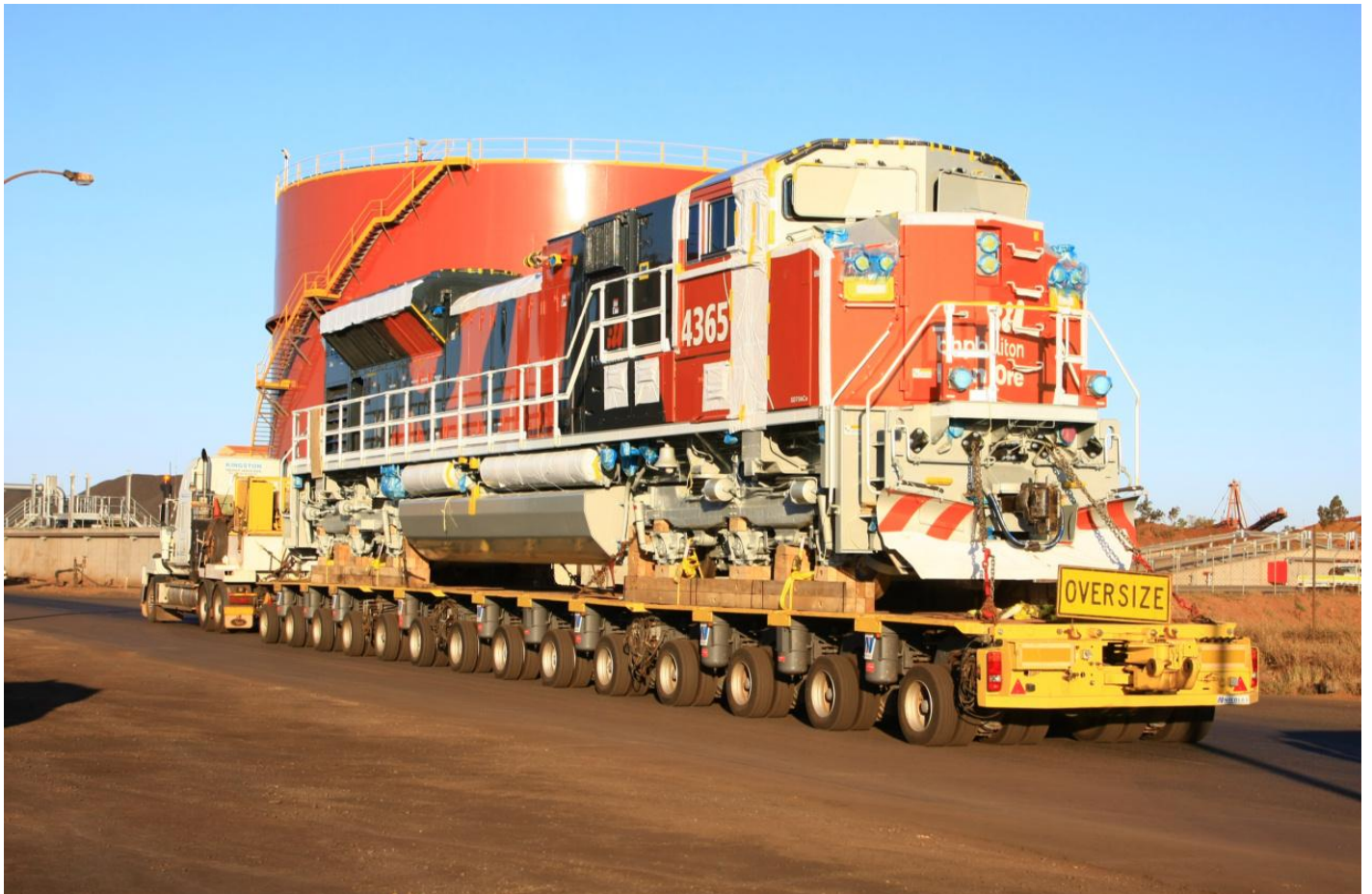
BHPB iron Ore SD&0MACe #4365 on 128 wheel float at Port Hedland September 2nd 2010 being hauled from wharf to hardstand at Nelson Point for unloading.