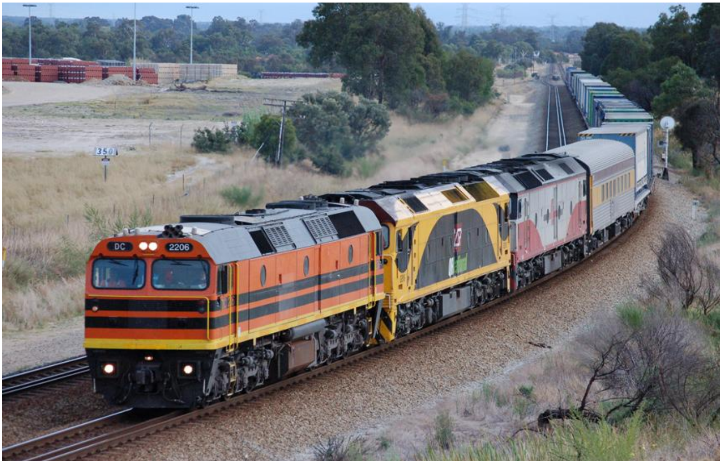
DC2206, G516 & SCT535 run 7AP1 QRN intermodal through South Guildford on March 30th 2009 with three locomotives, three different liveries, three different owners.