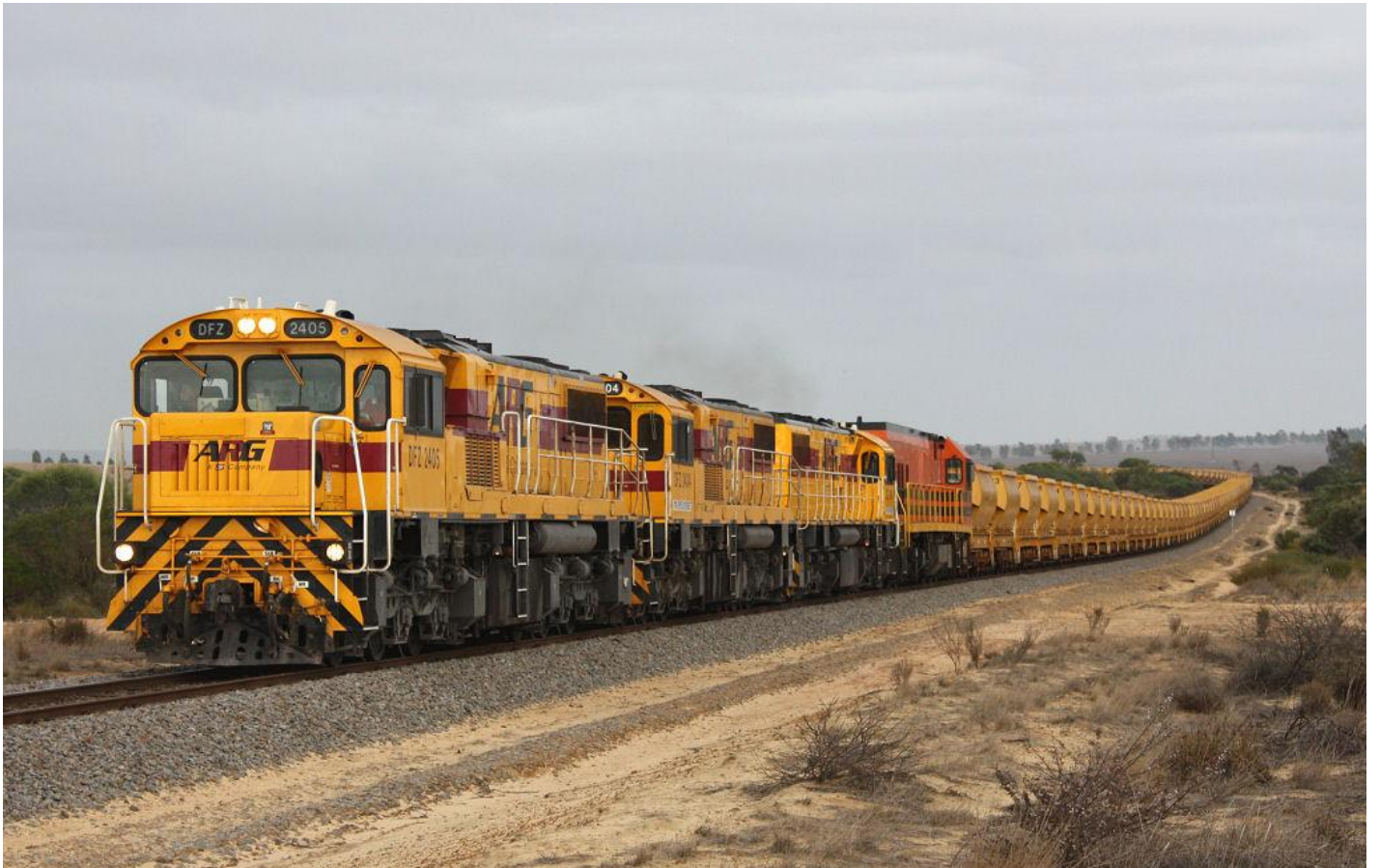
DFZ2405, DFZ2404, DFZ2401 & P2507 on 3720 empty ore test train at Amdania April 13th 2010 on its run to Perenjori to test train dynamics of long train.