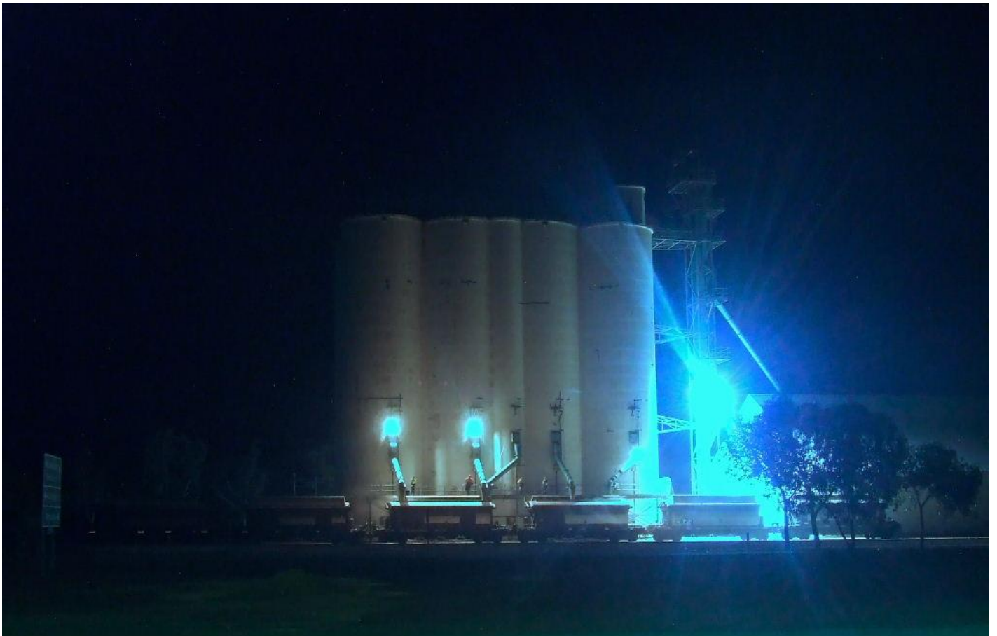
A scene repeated nightly on the wheat lines a grain being loaded under power, with the Trayning CBH silo lit up on April 7th 2010.