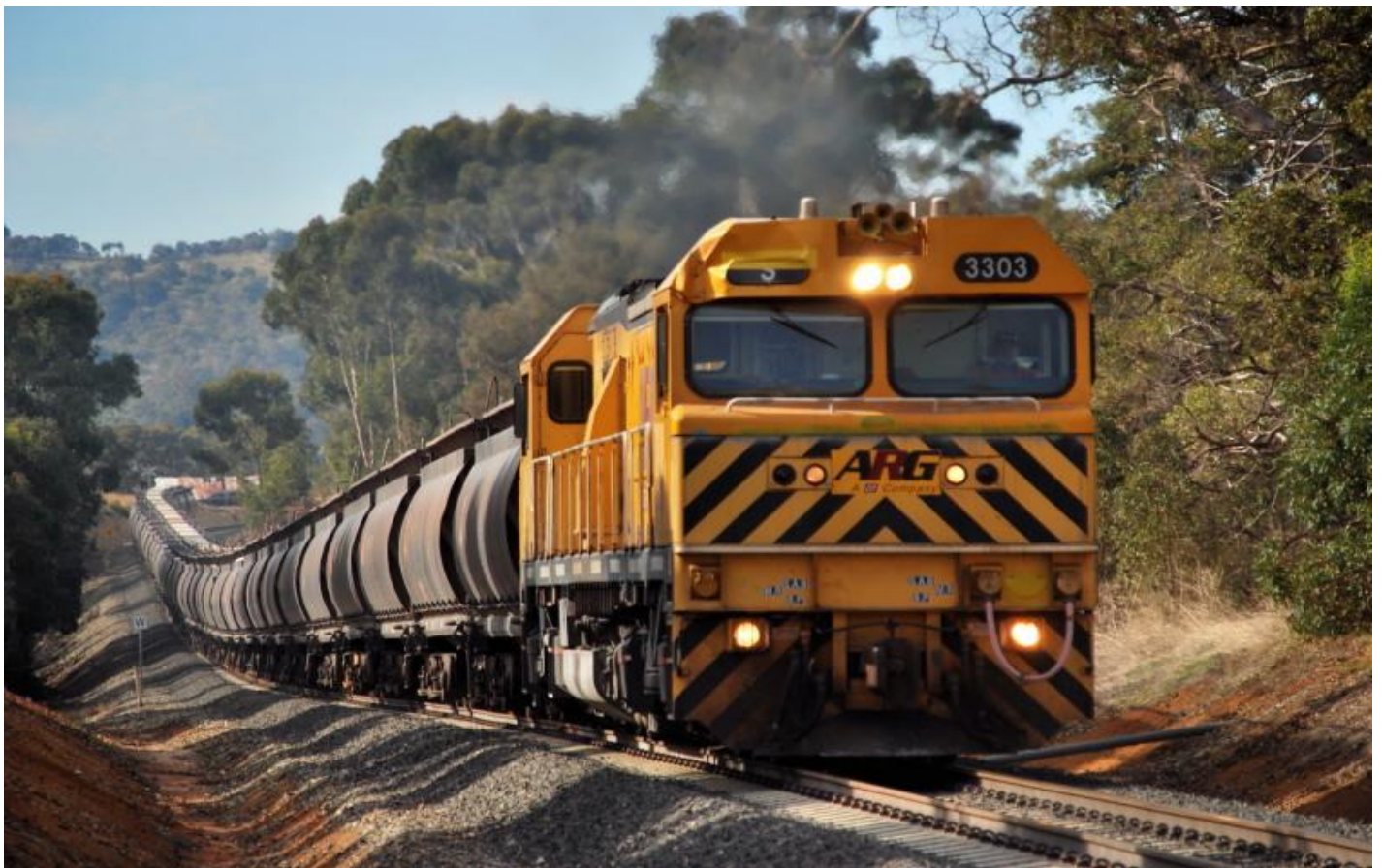
S3303 runs 7824 loaded alumina to Bunbury up the grade at Burekup May 30th 2009.