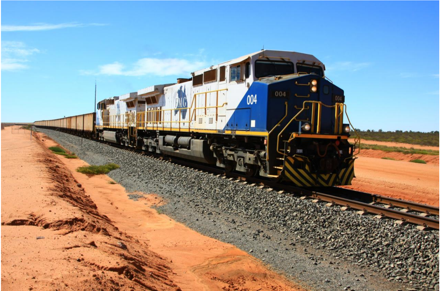
FMG CW44-9W 004 & 001 on empty ore rake departing Boodardie July 20th 2010.