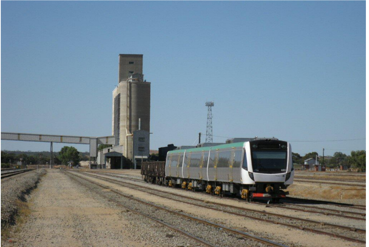
Transperth EMU set #482 stabled all alone in West Merredin yard on April 12th 2009.