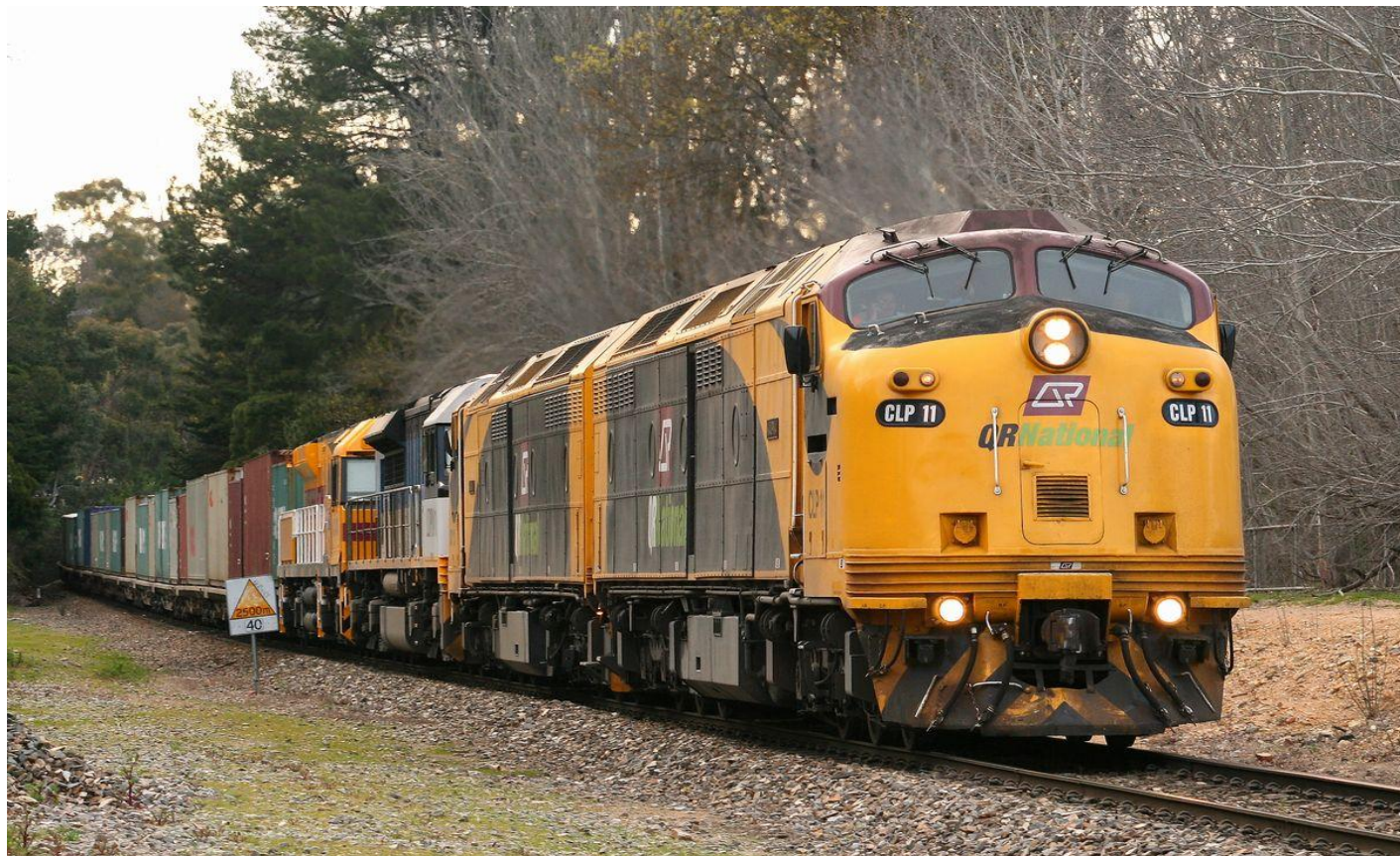
CLP11,CLP13 & LDP001 haul [dead attached] AC4301 on its delivery run from Melbourne to Adelaide on 3MA6 P&O intermodal through Bridgewater SA on August 19th 2009.

This the 100th edition of West Australian Railscene e-Mag that commenced with the first issue on January 5th 2009. In the following 89 weeks 100 e-mags have been published that features the work of 36 different photographers with photos taken in West Australia, South Australia, New South Wales and Queensland also in Ontario Canada. Photos taken in WA have covered the rail scene from the giant trains run by the Pilbara Miners; Rio Tinto, BHPBIO and FMG to a little work train on a jetty, from Esperance in the south east, Leonora in north east, Kalgoorlie and the trans line, Geraldton and the Mid West, Collie and Bunbury in the South West to the suburbs of Perth. Over the last 21 months Rio Tinto, BHPB Iron Ore and ARG have had new locomotives delivered, Transperth more EMUs delivered and QR National commencing operations into Western Australia. Production of this e-Mag has only been possible by having people willing to supply photos and information on what is happening in an ever changing world. In the next few years expansion of iron ore exports will see new mines in the Yilgarn and Mid West that will see more locomotives and rolling stock arriving. This e-Mag will cover the changes as they take place. Everyone I thank you for your support as photographers or contributors and those who have visited the web site to access the e-Mag.