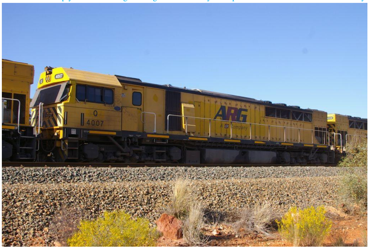
Q4007 has its protective blinds down to protect its cab windscreen as it runs behind Q4008 and ahead of Q4016 on 6418 empty ore train at Binduli on September 11th.