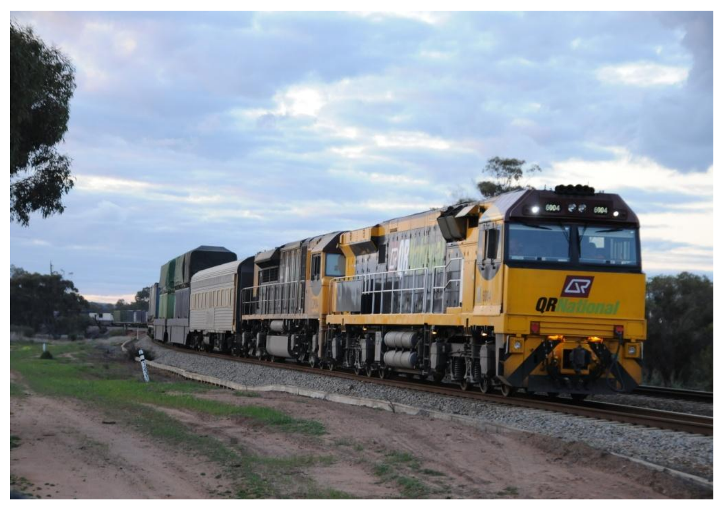
6004 & LDP004 on 7MP1 QRN intermodal in the Seabrook loop September 11th.