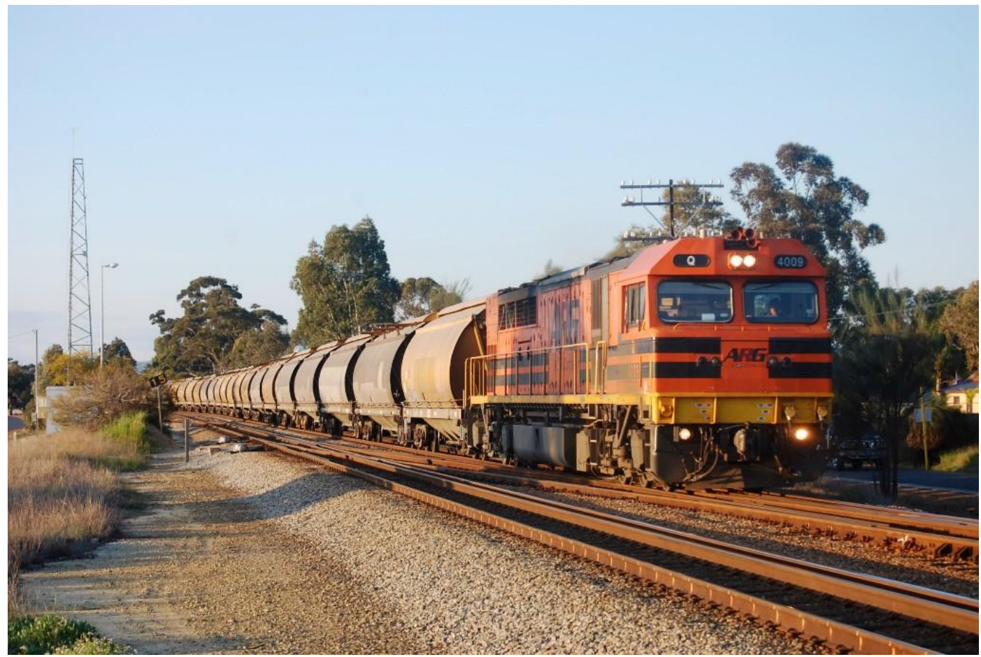
Q4009 runs 6058 grain train though Midland Railway crossovers Millendon September 10th.

LZ3104 has returned to traffic following overhaul but only works Soundcem shunter to Cockburn or container train with lead concentrate to North Port Fremantle it has never run a train into the Avon Valley.