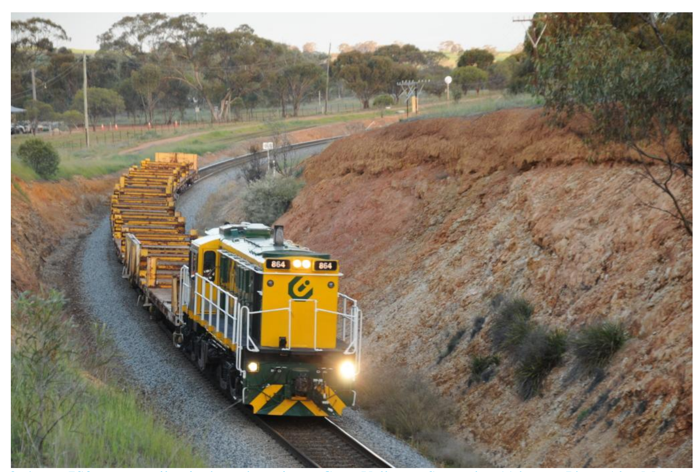
864 runs 7S36 empty rail train through cutting at Grass Valley on September 11th.