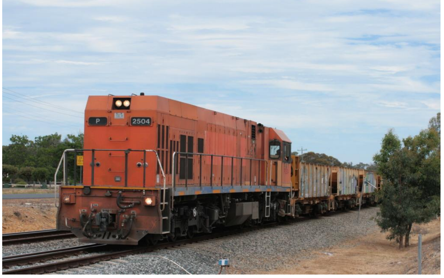
P2504 on 1BT3 empty ballast train at Oakover Road Middle Swan December 19th.