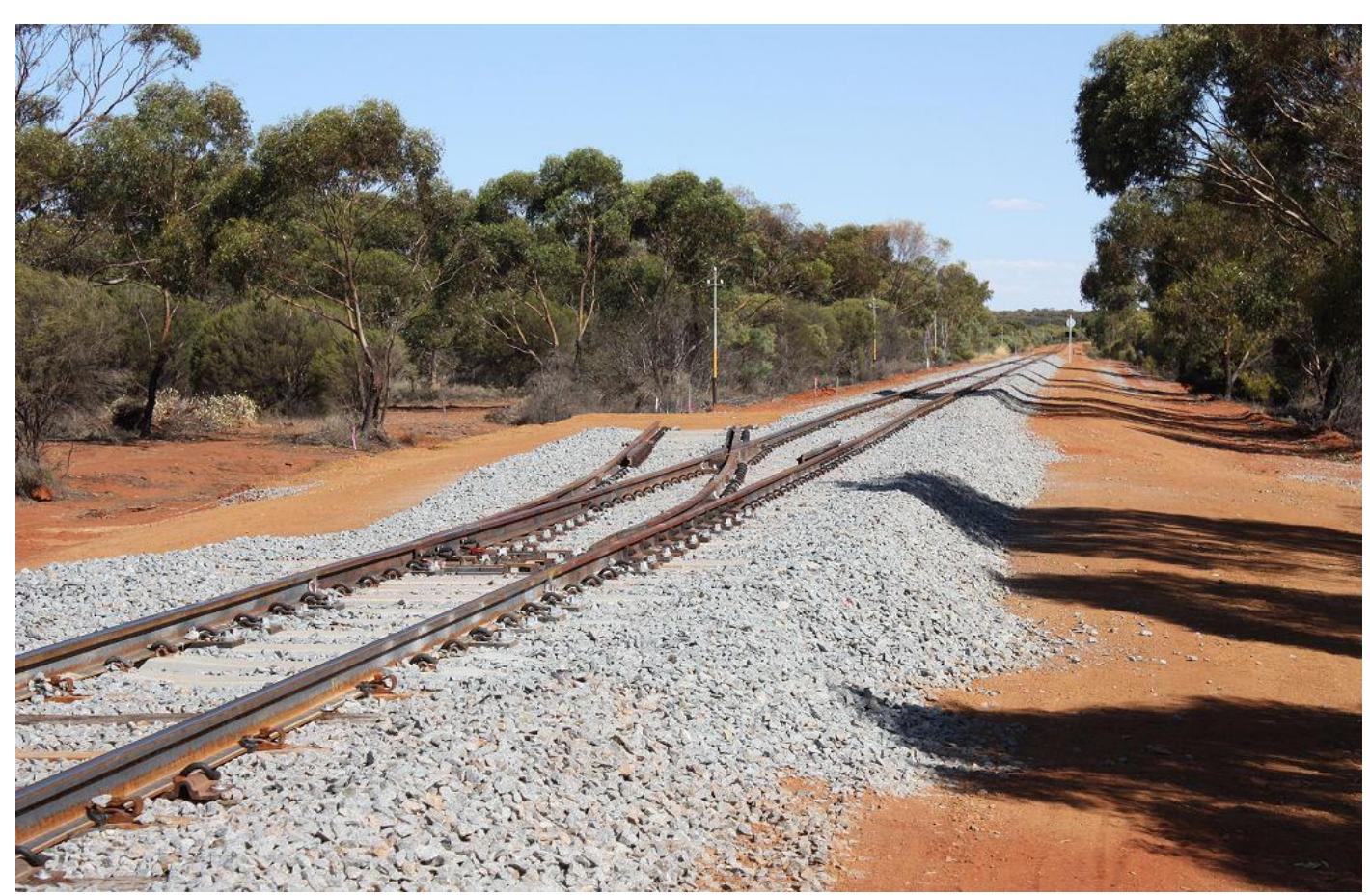
Points at Perenjori South going of main line to Mt Gibson loading facility December 12th.