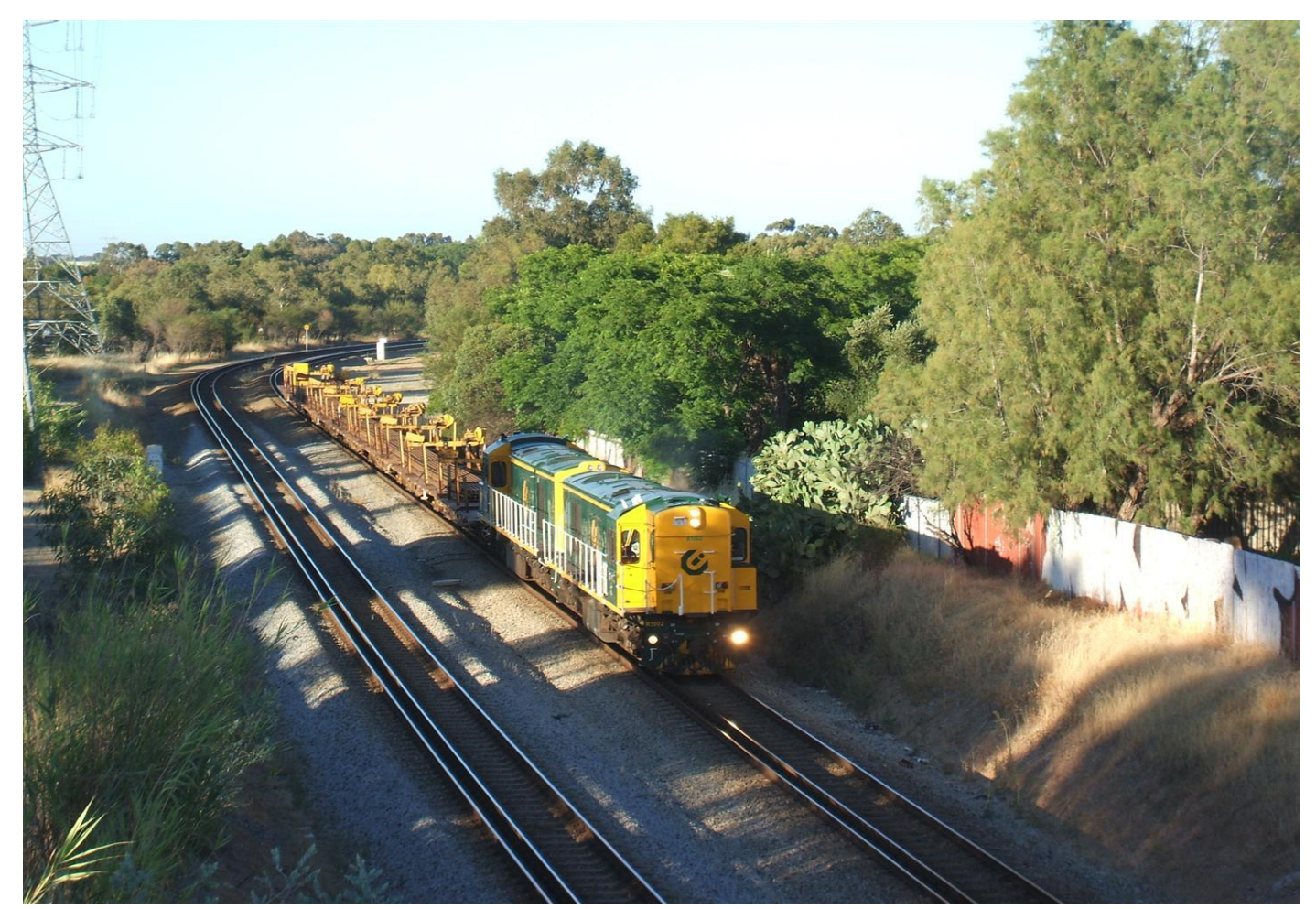
R1902 & KA212 on 6S23 rail train at Bellevue on December 10th.