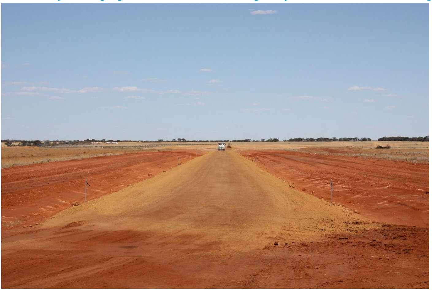
Earthworks December 12th for Mt Gibson siding the Extension Hill mine loading point on the eastern side of line to Maya south of Perenjori that will see 3 million tons of ore pa exported.