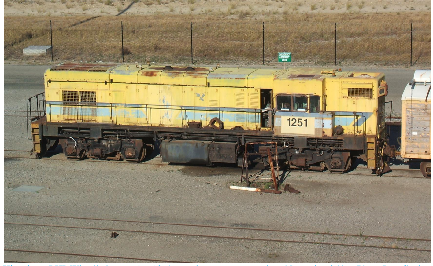
Historic ex BHP Whyalla locomotive 1251 stored at narrow gauge loco November 25th.