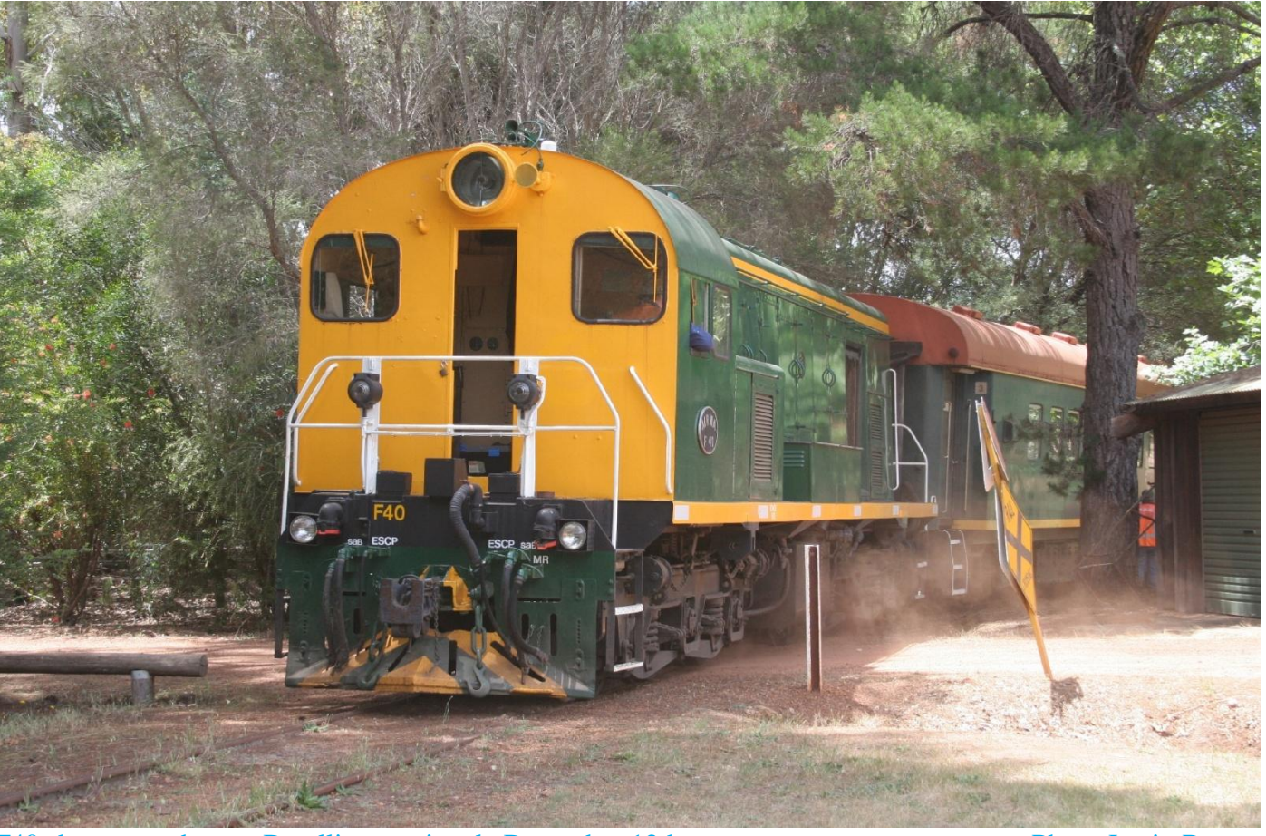
F40 shunts coaches on Dwellingup triangle December 12th.