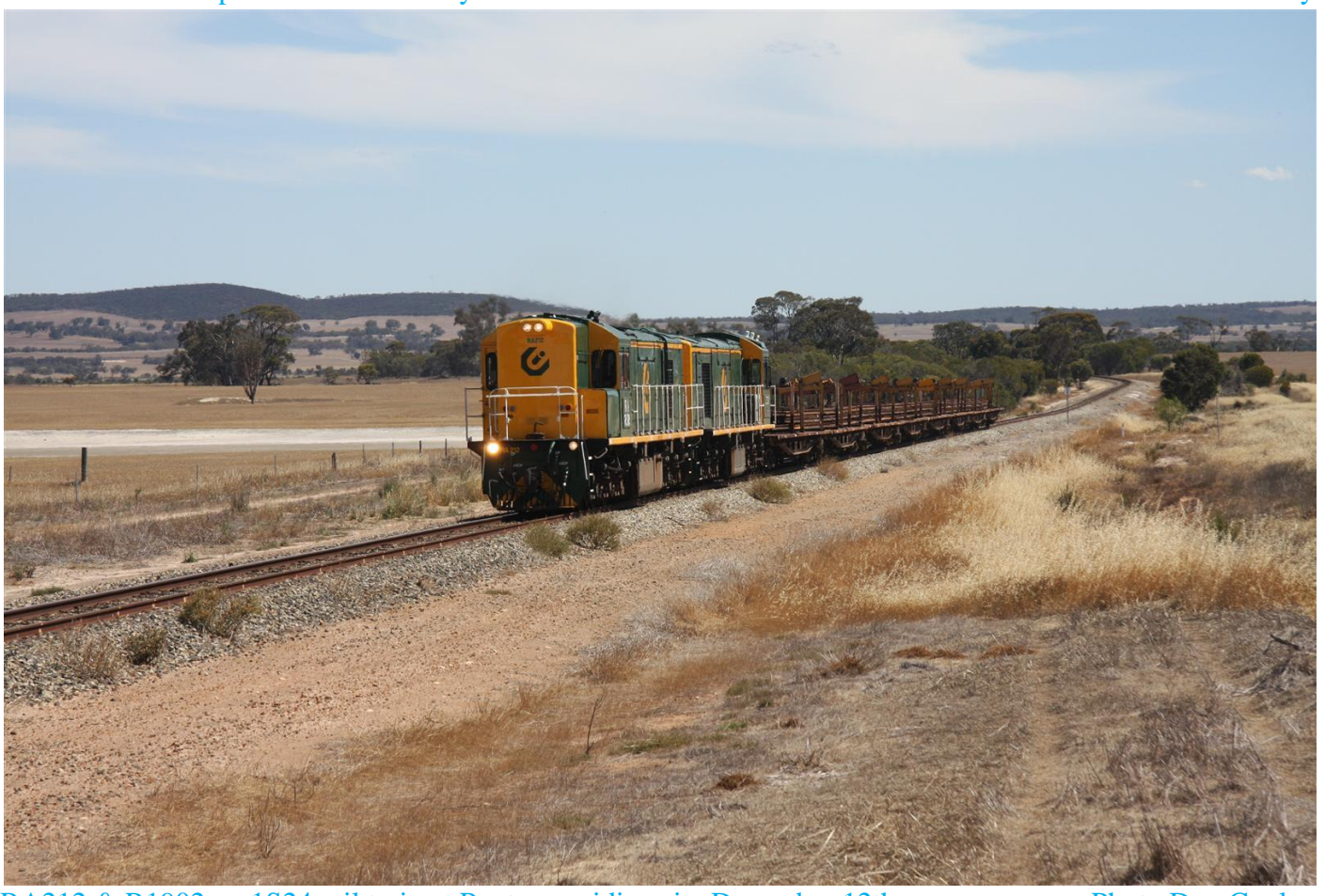
RA212 & R1902 on 1S24 rail train at Pootenup siding site December 12th.