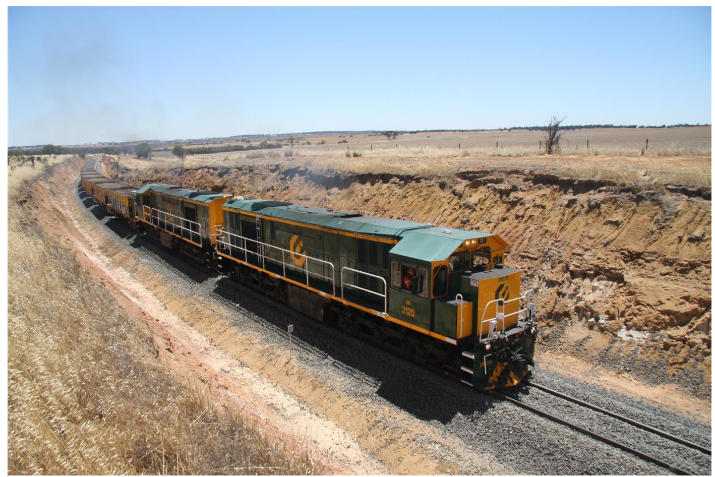
ZB2120 & ZB2125 on ballast train at Moojebing on December 12th.