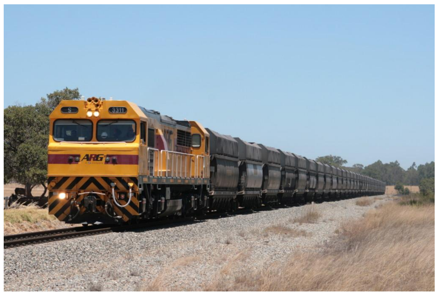
S3311 on 7556 export coal train at Keysbrook on December 18th.