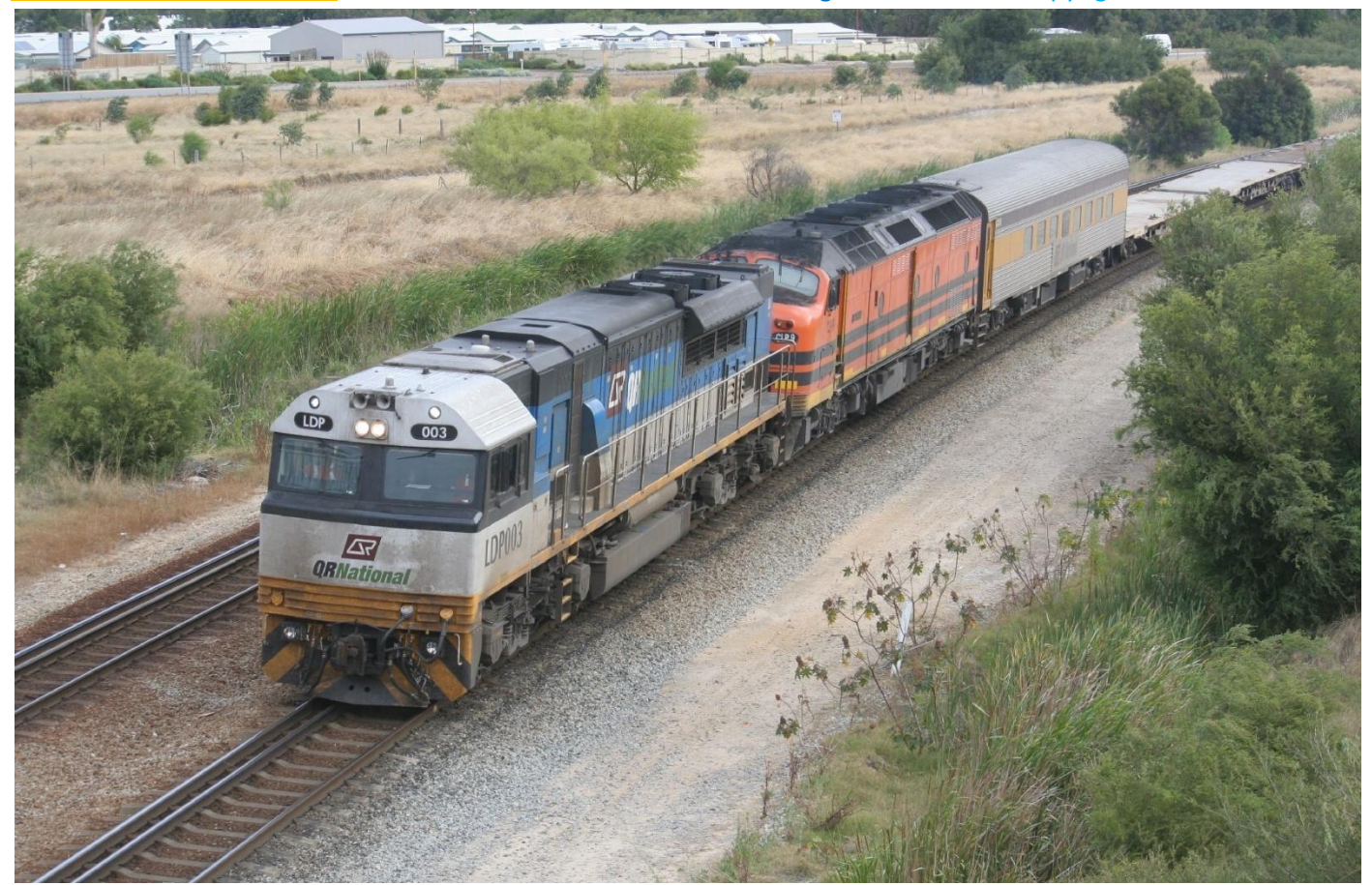
LDP003 & CLP9 run 2PM1 QRN intermodal at High Wycombe on December 13th.

West Australian Railscene e-Mag is published weekly by Jim Bisdee on rail happenings on West Australian Railroads WWW.WESTERNRAILS.COM follow West Australian Railscene e-Mag on facebook Copyright Jim Bisdee © 2010