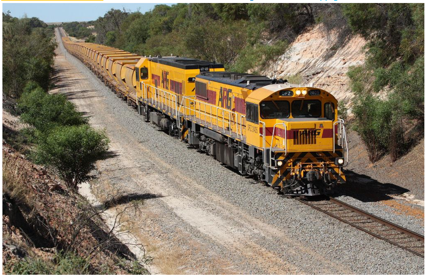
DFZ2405 & P2510 run iron ore train up the grade through Bringo on December 11th unusual as the DFZ is leading as P class usually lead loaded ore trains into Geraldton.

West Australian Railscene e-Mag is published weekly by Jim Bisdee on rail happenings on West Australian Railroads WWW.WESTERNRAILS.COM follow West Australian Railscene e-Mag on facebook Copyright Jim Bisdee © 2011