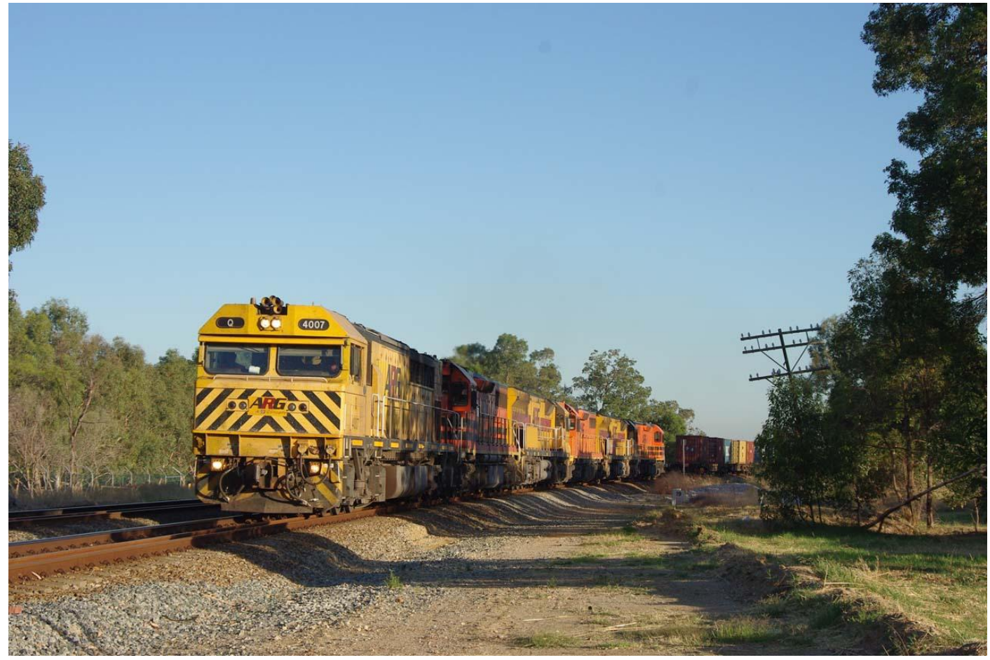
Q4007, LZ3101, AC4303, LZ3120, AC4308 & L3110 run rare six engine lash up of four different liveries on 5426 freight ex Kalgoorlie at Swan View early morning on December 24th.

P2501 & P2516 loading grain train at Maya at end of tier three line December 12th.