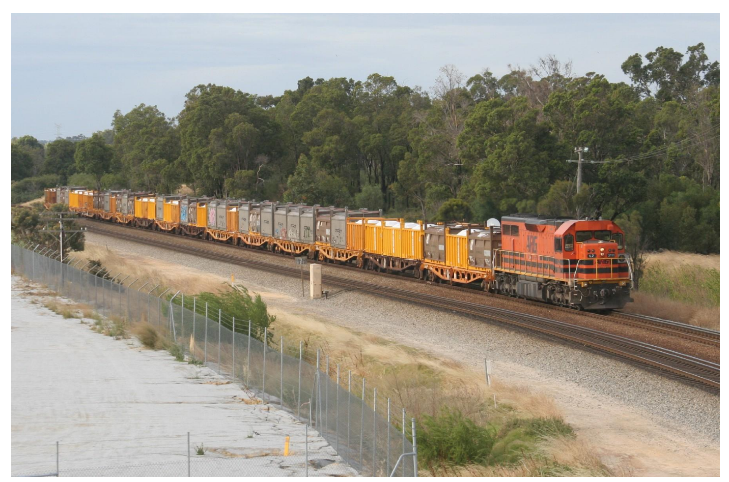
LZ3111 runs 2474 salt train through South Guildford on December 20th.