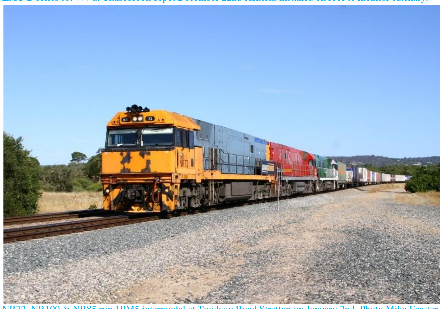
NR72, NR109 & NR85 run 1PM5 intermodal at Toodyay Road Stratton on January 2nd.