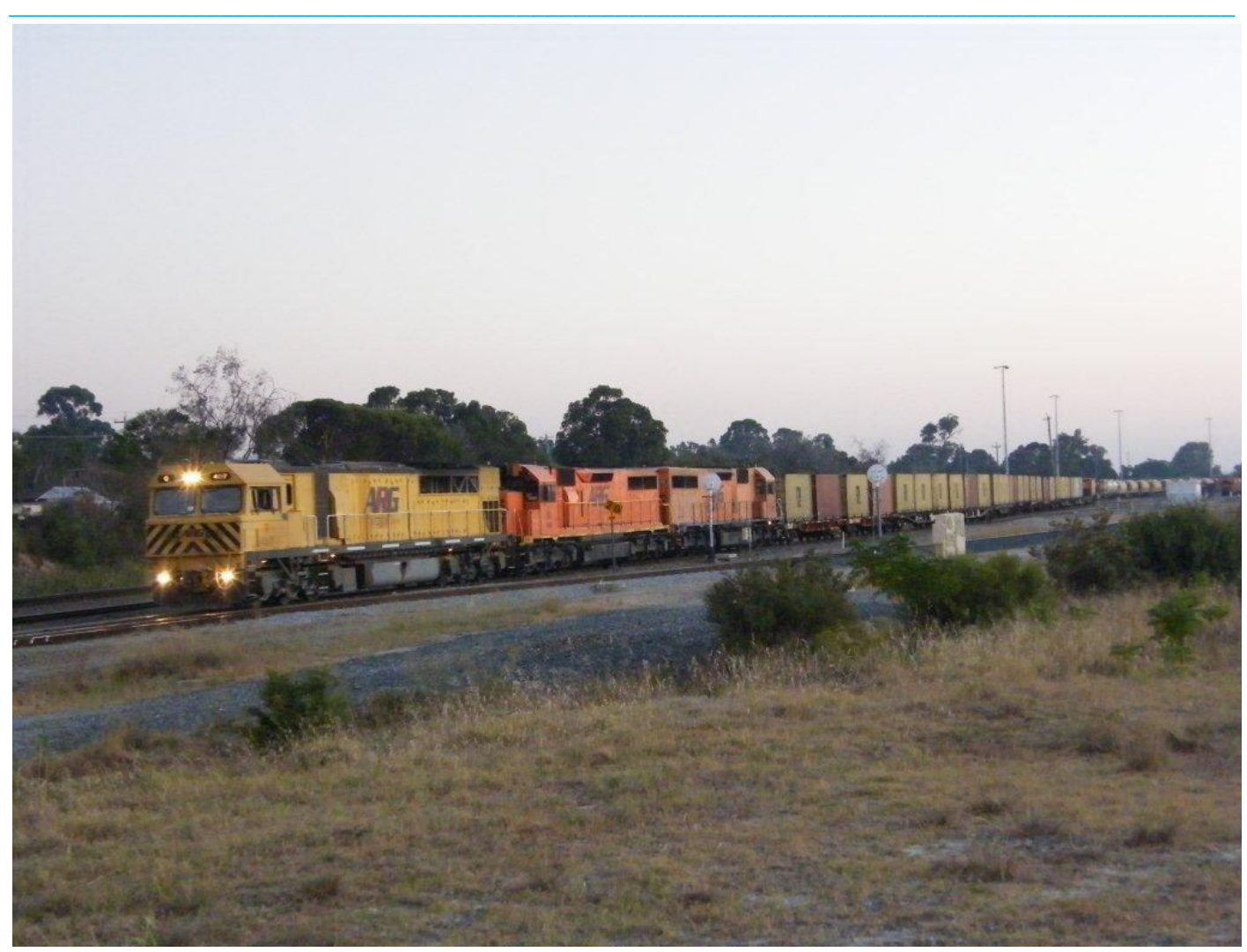
Q4017, LZ3120 & L3118 run 6025 Kalgoorlie freight out of Forrestfield Yards at 1935 after sunset on the last day of the year December 31st.

NJ1602 and NJ1605 have been withdrawn from Albany with the woodchip services now being run by DD class locomotives. These NJ locomotives were never that successful on the woodchip services especially after the number of wagons was increased. Both these locomotives are presently stored at Avon Yard Northam owing to reduced need for motive owing to poor grain harvest.