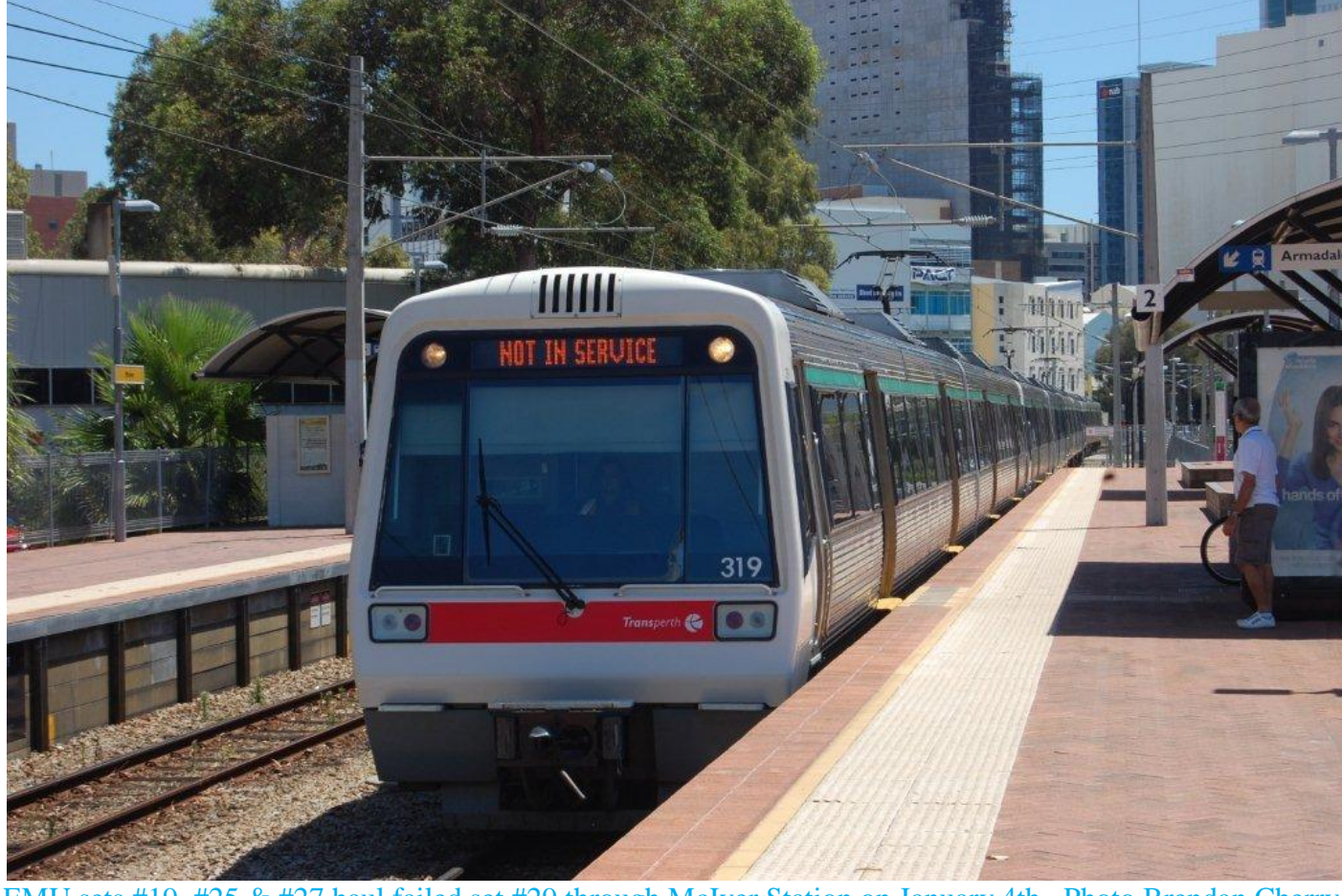
EMU sets #19, #25 & #27 haul failed set #29 through McIver Station on January 4th.