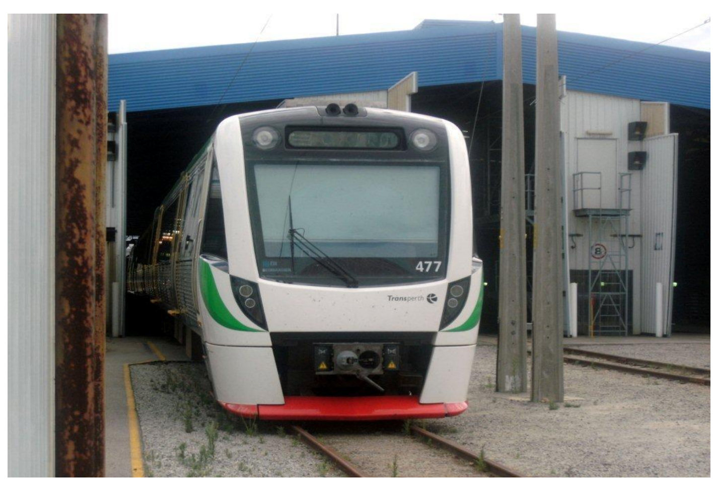
EMU B series set #77 at Claisebrook depot December 22nd cameras installed on roof to monitor catenary.