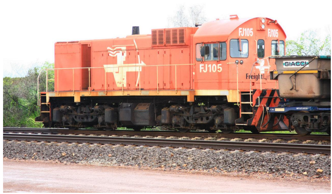
FJ105 ex Westrail J105 now yard shunter Berrimah Terminal NT December 12th.