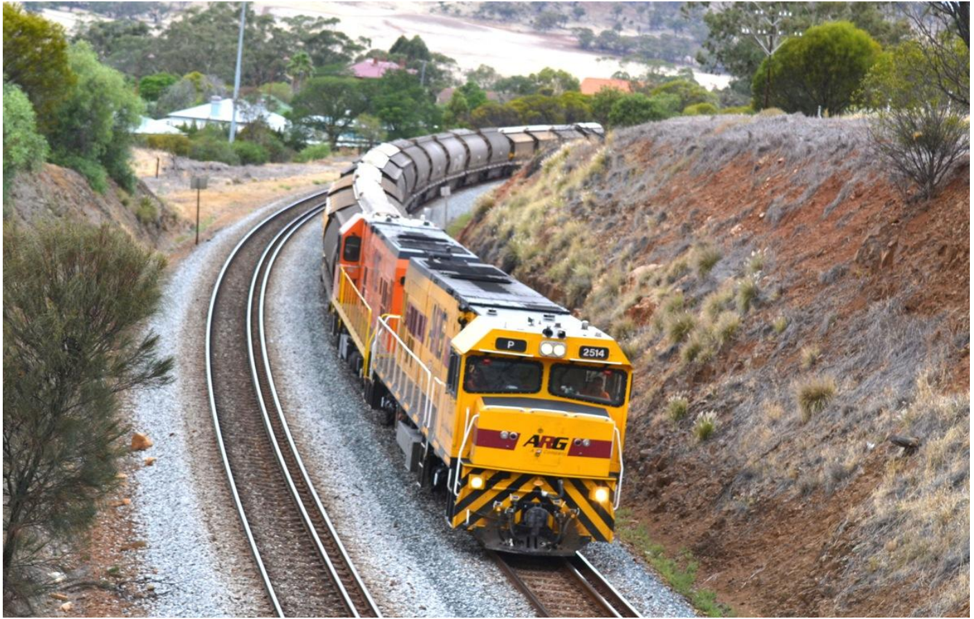
P2514 & P2516 run grain train through Toodyay on February 20th.