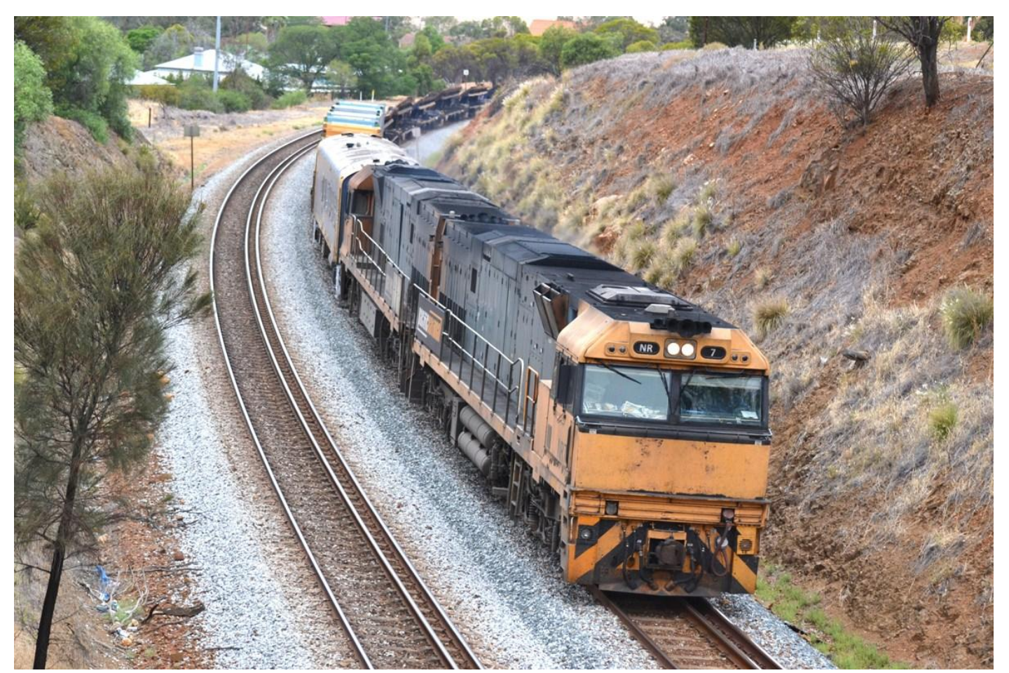
NR7 & NR90 run 4WP2 steel train through Toodyay on February 20th.