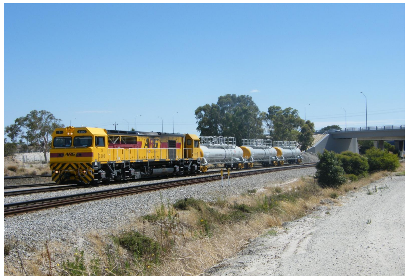
S3302 runs 7122 empty wagon movement Forrestfield to Picton of new JP caustic tankers built by Gemco Forrestfield through Kewdale on February 12th.