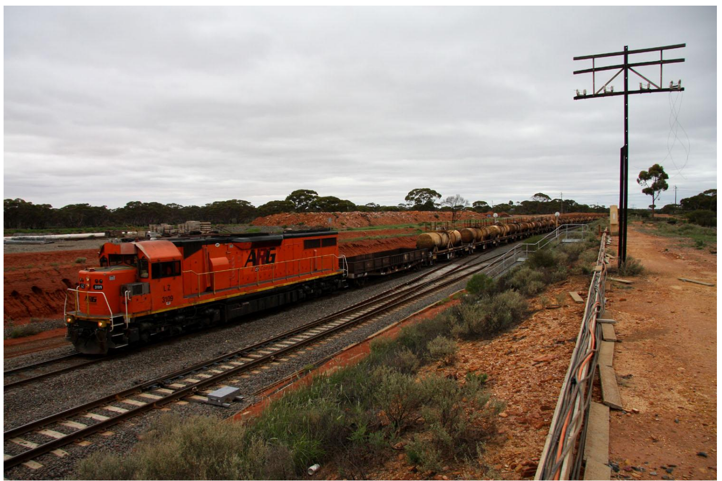
LZ3109 on 7410 acid tankers from Hampton entering West Kalgoorlie yard March 5th.