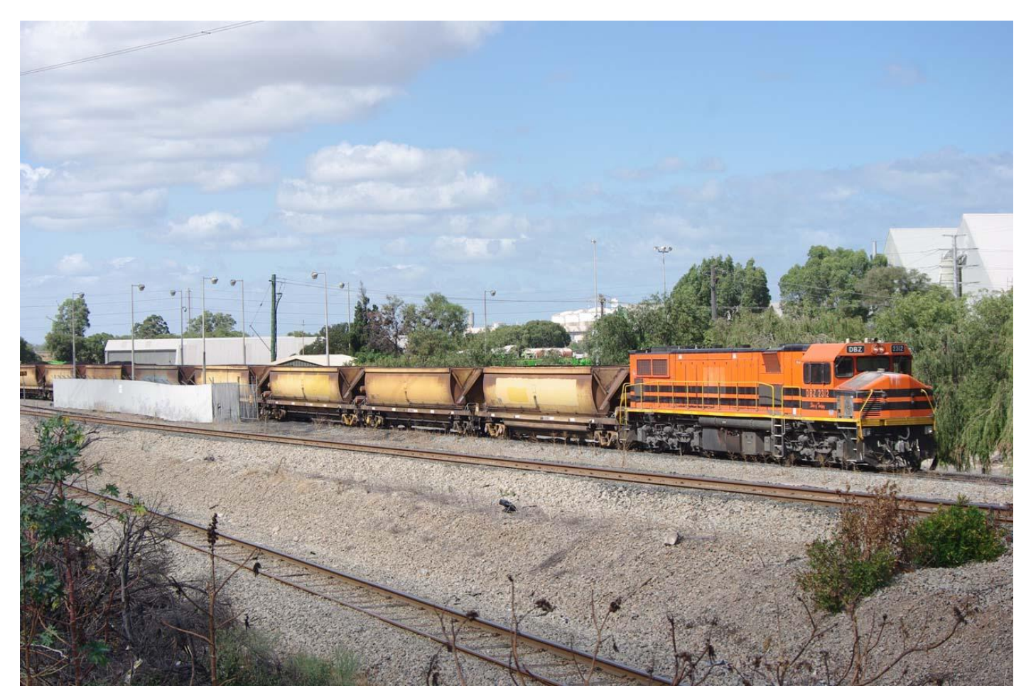
DBZ2312 on 1572 coal train unloading at Western Power Kwinana March 6th.