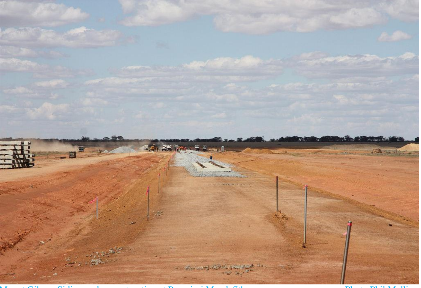
Mount Gibson Siding under construction at Perenjori March 7th.