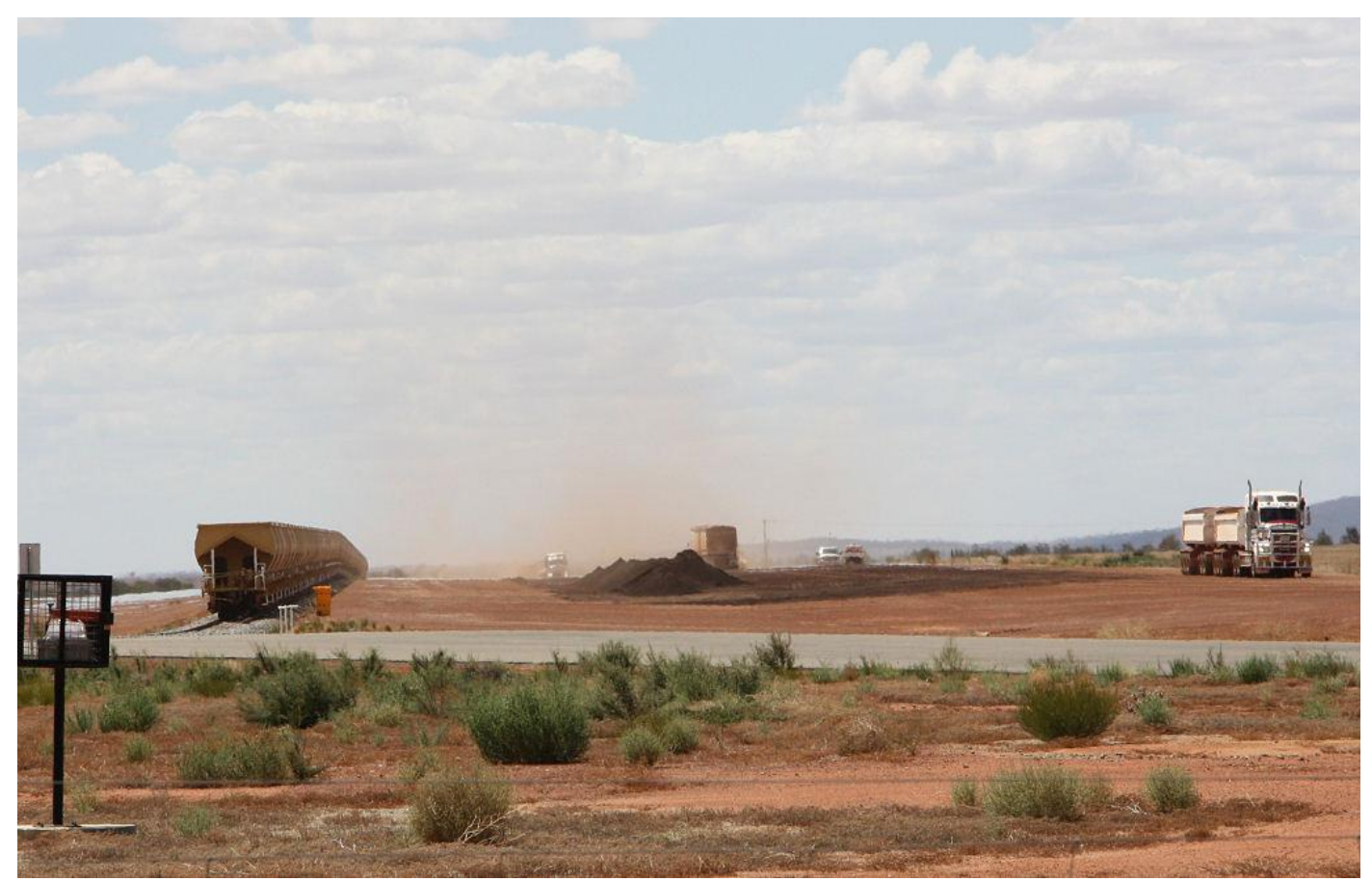
Tilley Siding March 7th with stored Sinosteel Midwest ore cars that will be used to haul Gindalbie Metals iron ore to Geraldton for export prior to Karrara line being completed.