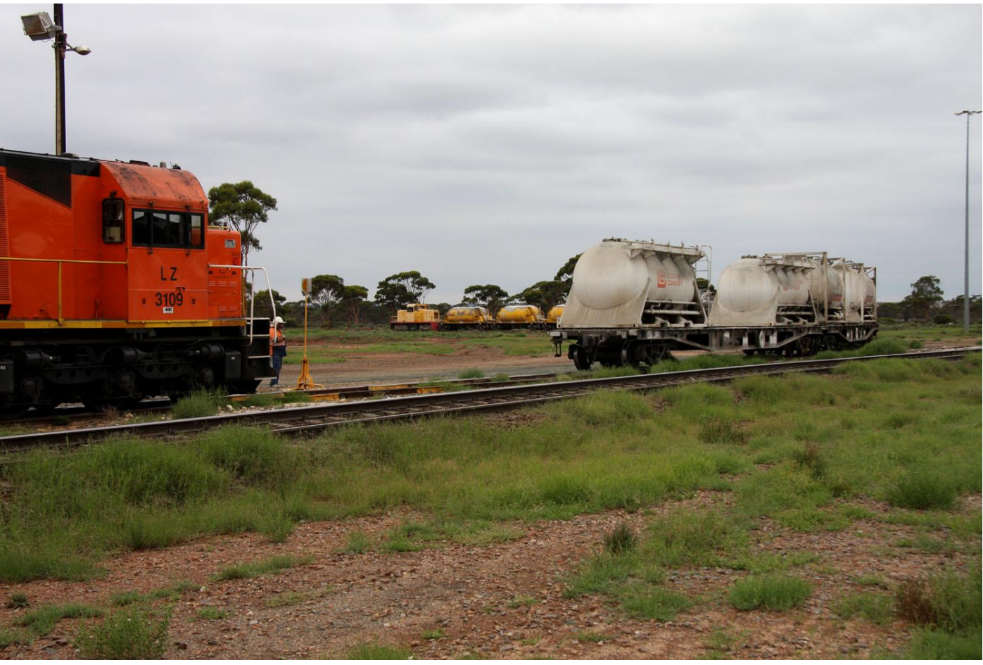
LZ3109 on 7C73 shunt with #49 lime works shunter on Parkeston triangle March 5th.