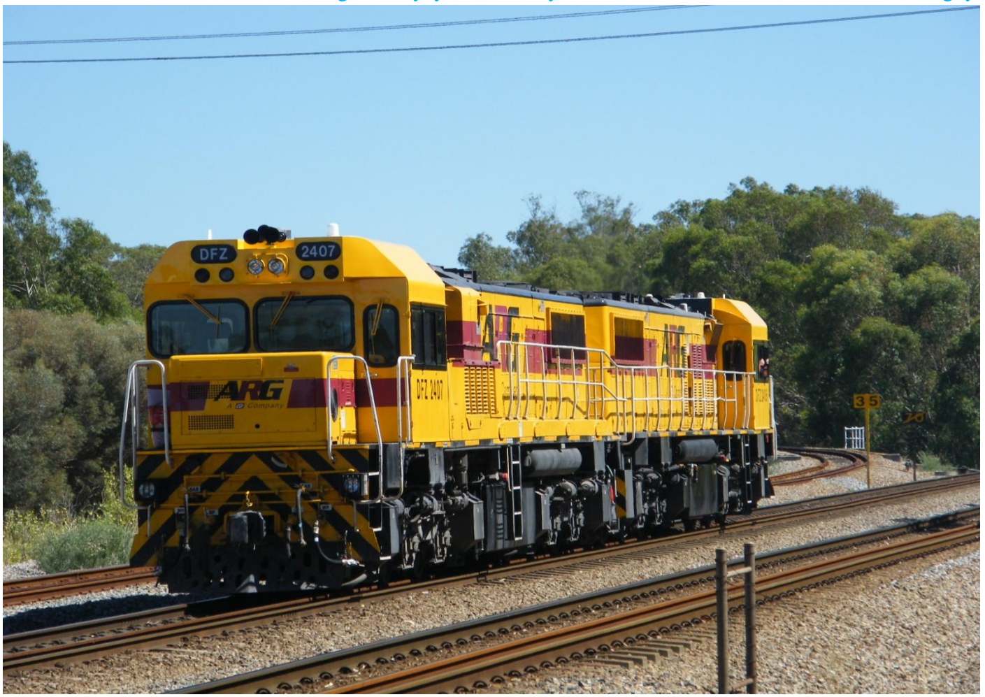
DFZ2406 & DFZ2407 following cab conversions run on February 2nd 4755 light engine to Narngulu up the east leg of Woodbridge triangle at the start of their long run north and return to traffic.