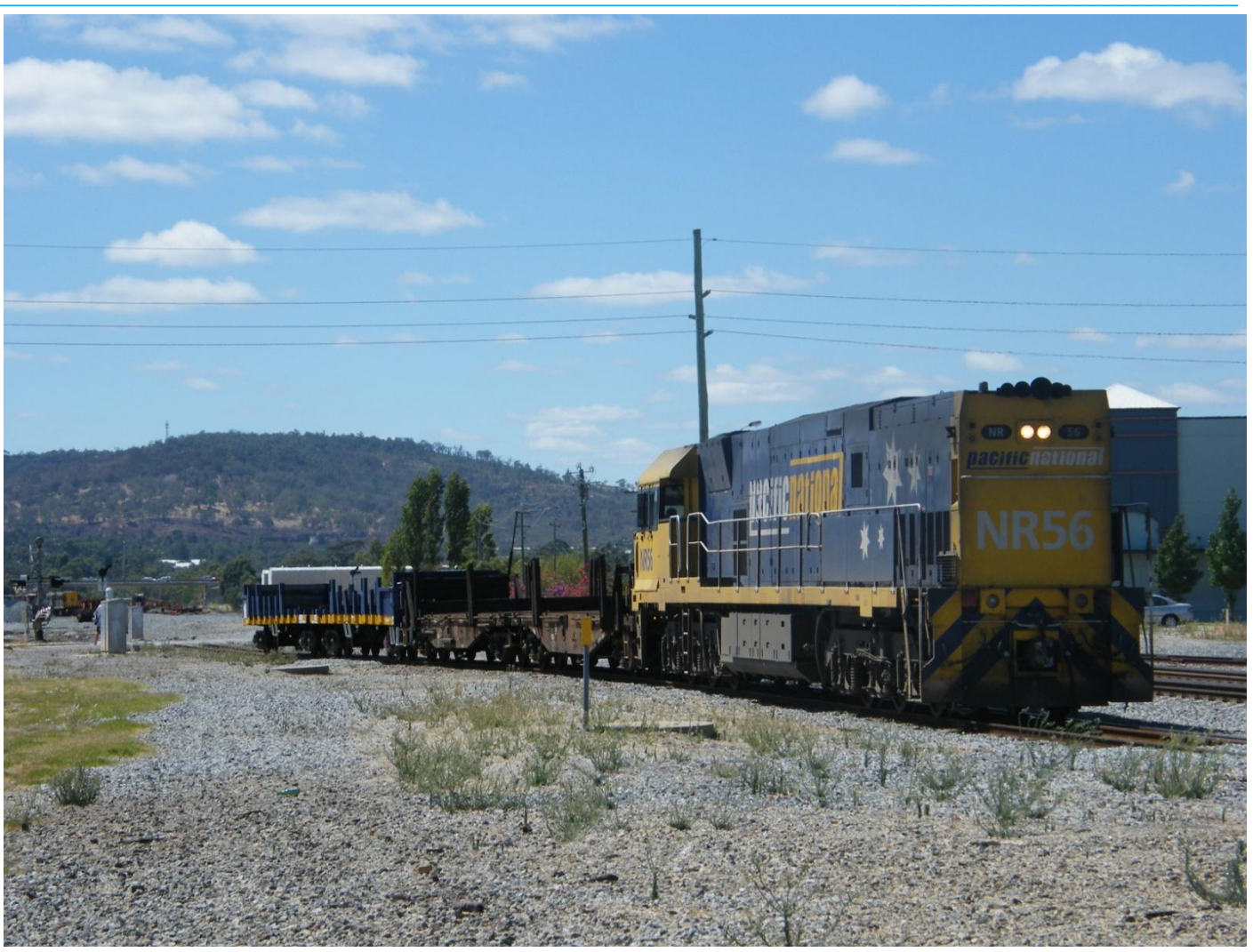
NR56 Pacific National yard shunter Kewdale runs 7P26 two empty rail wagons out of flashbutt on February 18th now sees NRs used in this capacity with no 80 or 81 class shunter.

A proposal under consideration for 159 ore cars trains between Koolyanobbing and Esperance is believed to be 2 locos, 53 ore cars, 1 loco 53 ore cars, 1 loco 53 ore cars. These 159 car ore trains with four locomotives would be around 1750-1800 metres.