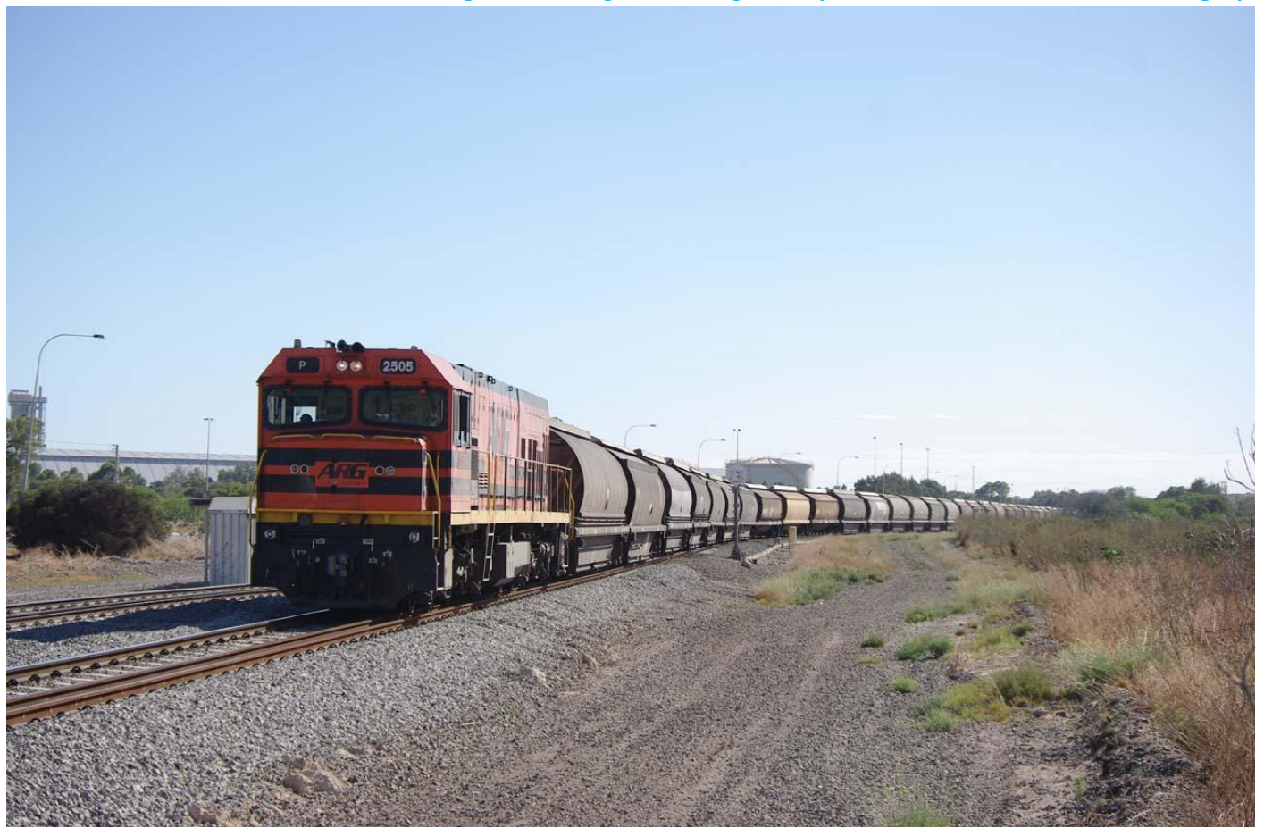
P2505 prototype unit in P class overhaul programme it was rebuilt following extensive damage when it hit a car in Merredin in July 2001 hauls 1302 grain into Kwinana March 6th.