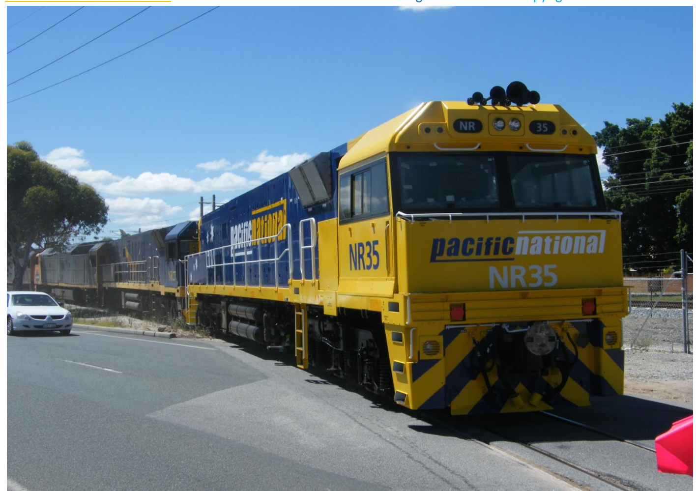
NR35 rear of 2P29 engine turn behind AN2, AN1 & NR27 crosses Railway Parade Bassendean March 7th on the way to Pacific National Kewdale following its rebuilding by UGR. Photo Jim Bisdee

West Australian Railscene e-Mag is published weekly by Jim Bisdee on rail happenings on West Australian Railroads WWW.WESTERNRAILS.COM follow West Australian Railscene e-Mag on facebook Copyright Jim Bisdee © 2011