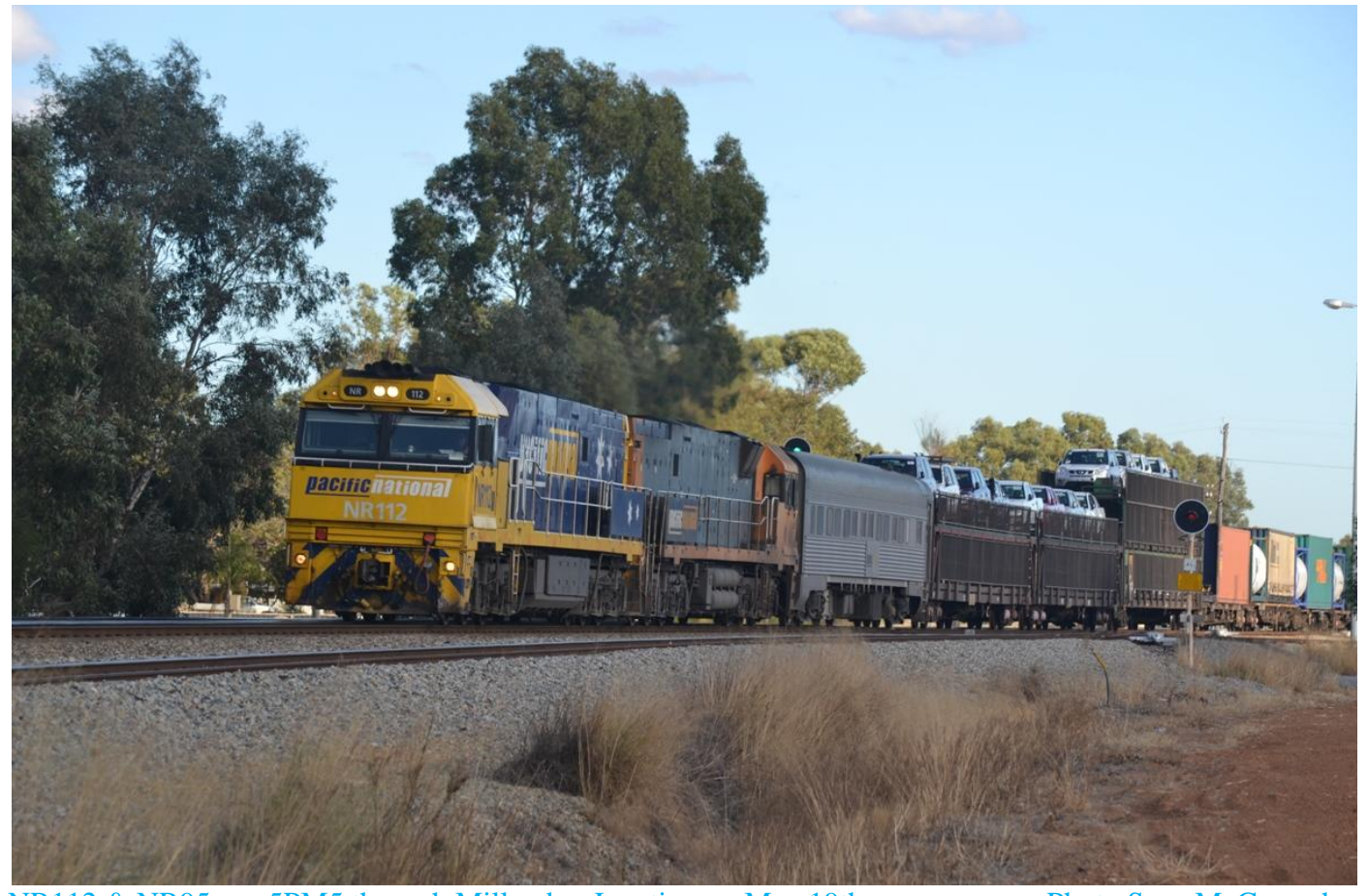
NR112 & NR95 run 5PM5 through Millendon Junction on May 19th.