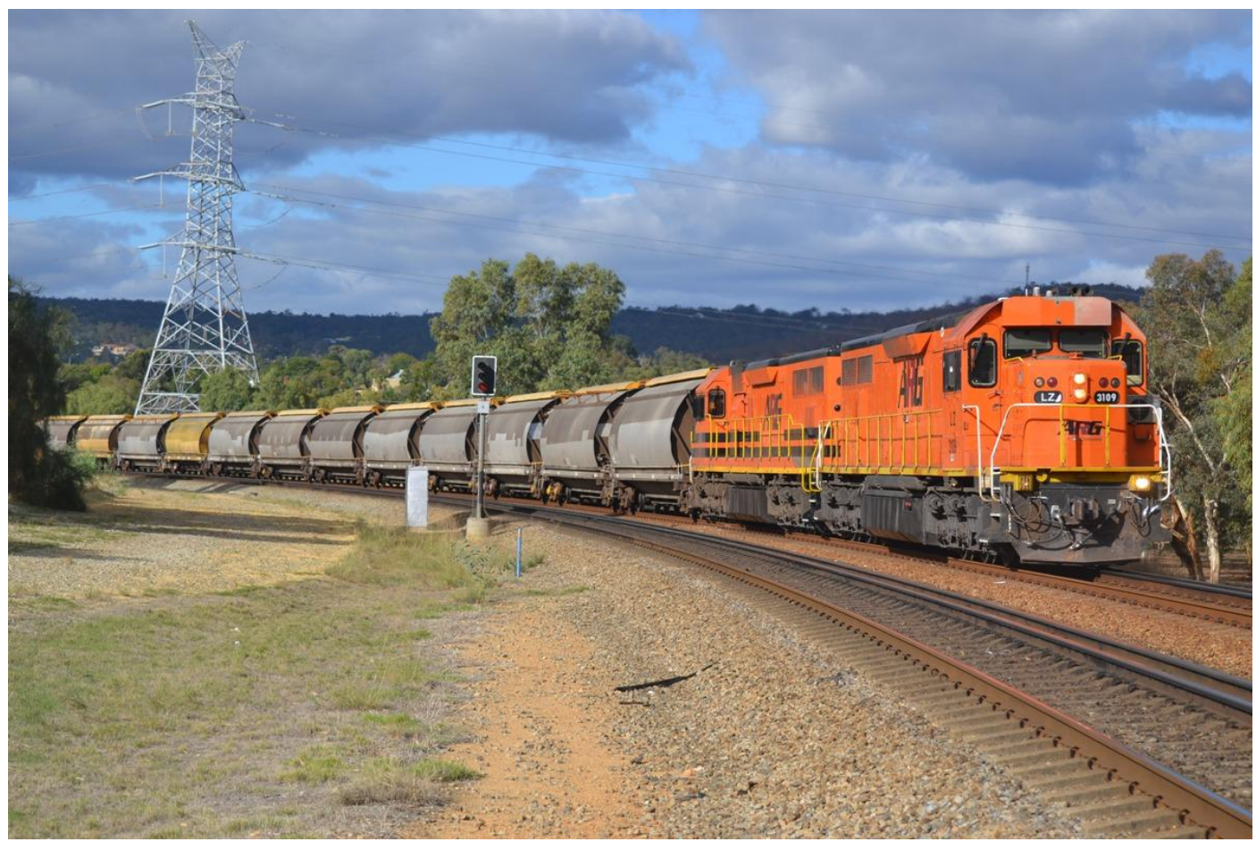
It is still possible to find multi coupled LZ locomotives running grain trains here LZ309 & LZ3117 run 7056 through Bellevue May 21st that come May 2012 with new grain contract will end.