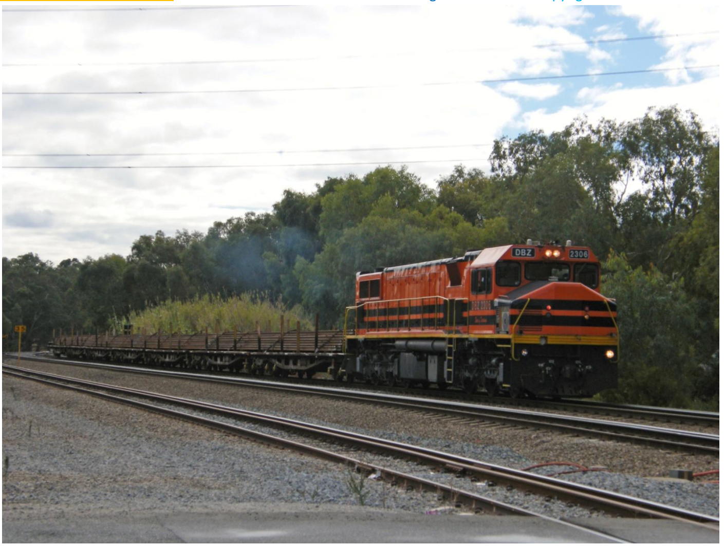
DBZ2306 runs 4RT2 loaded rail train down the east leg of Woodbridge triangle on May 25th that with ARG now running many of these works trains again sees them hauling vacuum braked trains.

West Australian Railscene e-Mag is published weekly by Jim Bisdee on rail happenings on West Australian Railroads WWW.WESTERNRAILS.COM follow West Australian Railscene e-Mag on facebook Copyright © Jim Bisdee 2011