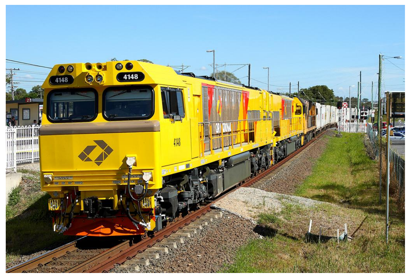
4148, 4147 & 2808 run Y874 Rockhampton to Fishermans Island freight at Lindum Qld the 4100s trial run May 7th prior to being prepared at Redbank Workshops to be trucked to WA operations.