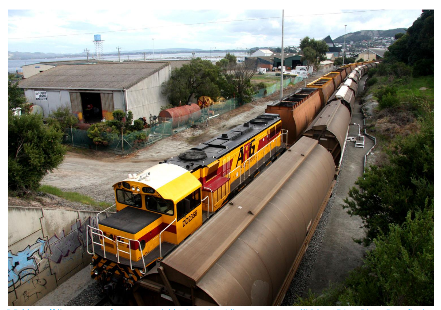
DD2356 off line on rear of empty woodchip departing Albany on run to mill May 17th.