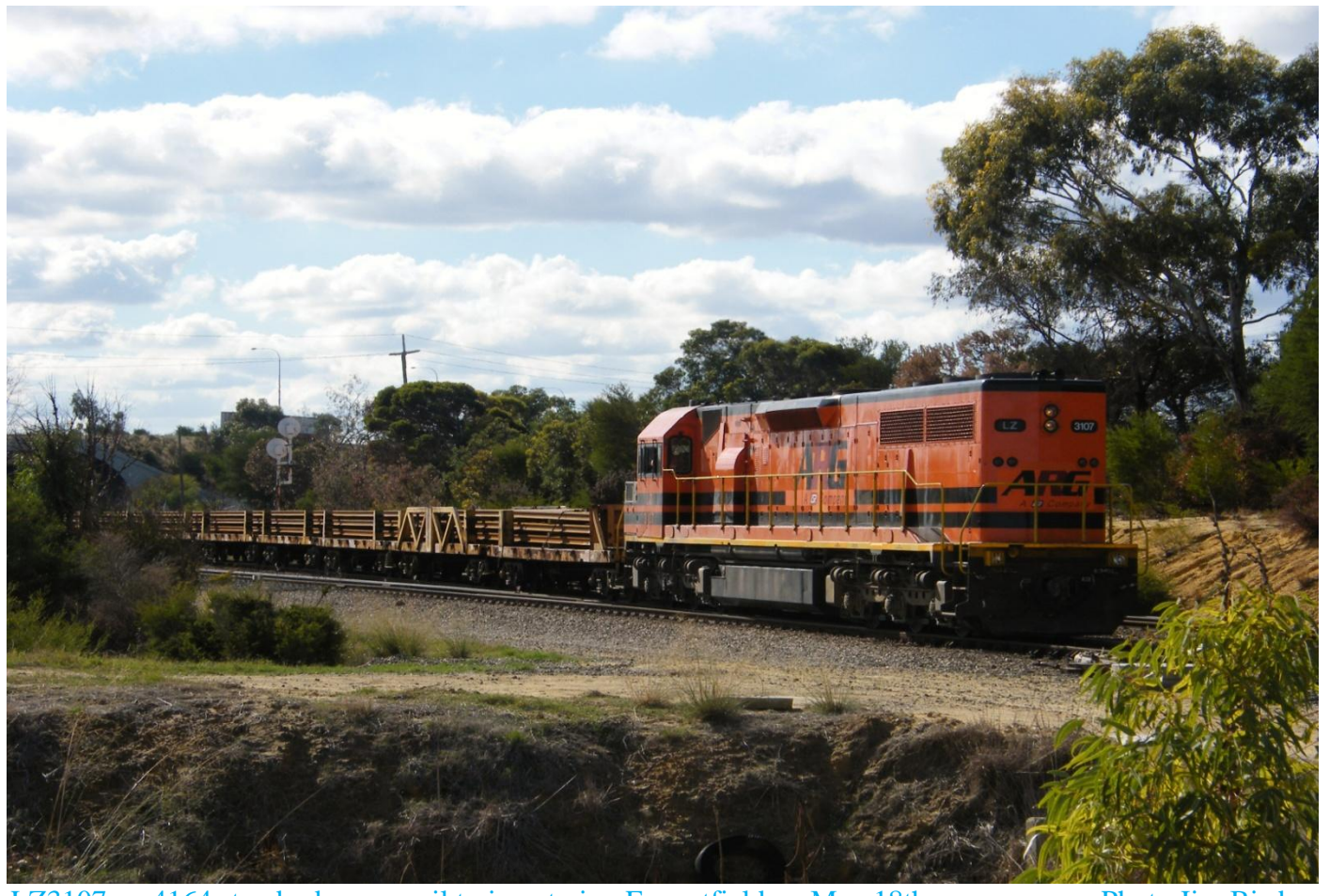
LZ3107 on 4164 standard gauge rail train entering Forrestfield on May 18th.