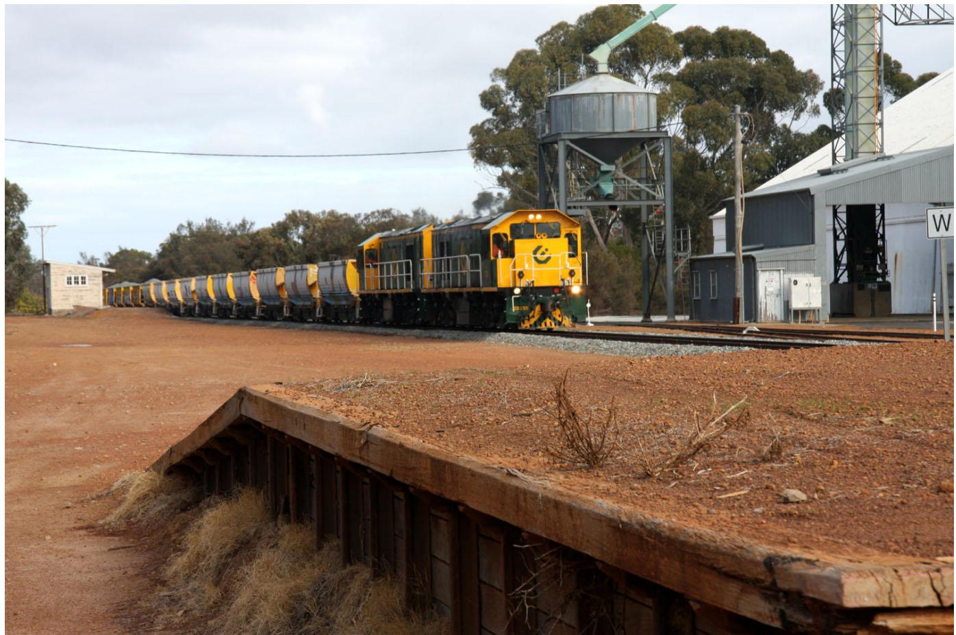
ZB2125 & ZB2120 run partly loaded ballast train through Woodanilling May 21st.