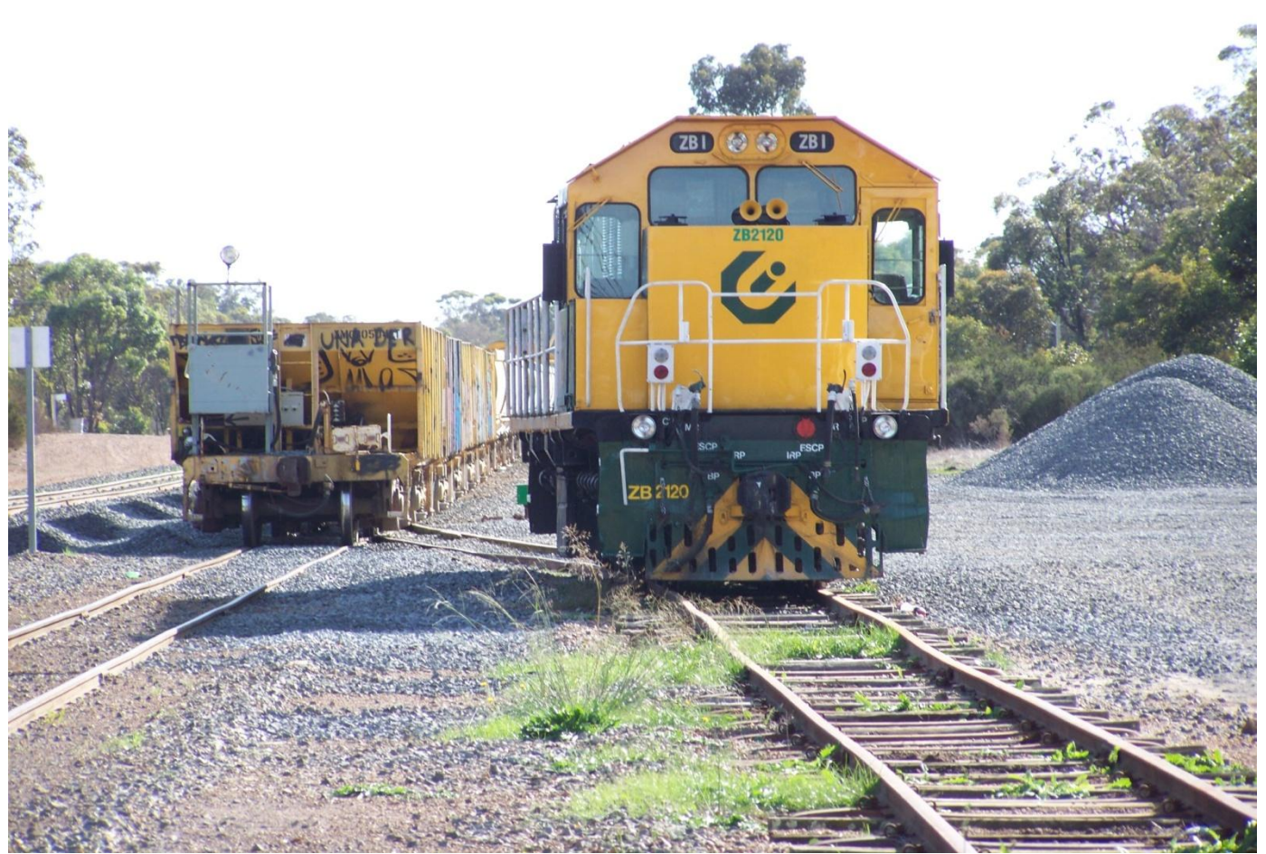
ZB2120 still with ZB1 in number boards in cripple road at Tambellup with empty ballast train stabled in the loop with ZB2125 attached at to the north end.

South Spur Rail ballast that had been engaged on the GSR track upgrading between Wagin and Redmond ran north on May 21st to Wagin then on Bellevue following completion of the upgrading project.