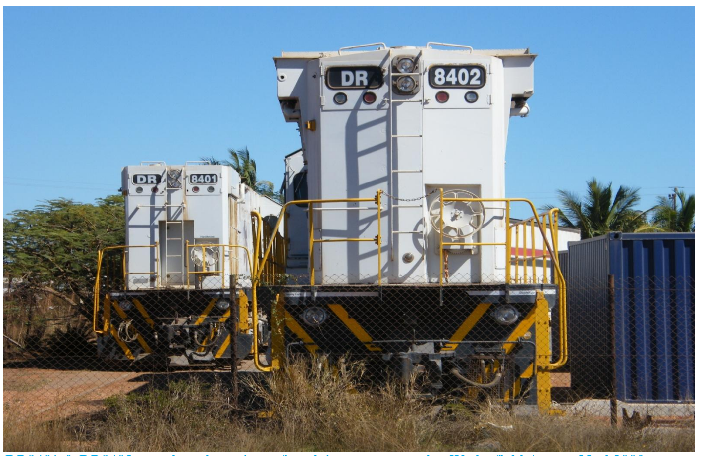
DR8401 & DR8402 stored on short piece of track in transport yard at Wedgefield August 22nd 2009.