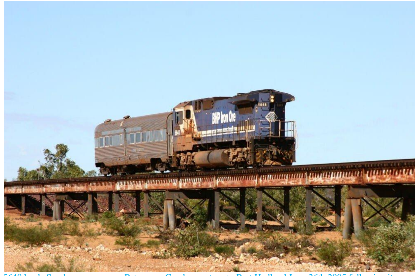
5648 hauls Sundowner car over Petermaer Creek on return to Port Hedland June 26th 2005 following its use at Goldsworthy on last Black Rock race run from there to Hedland.