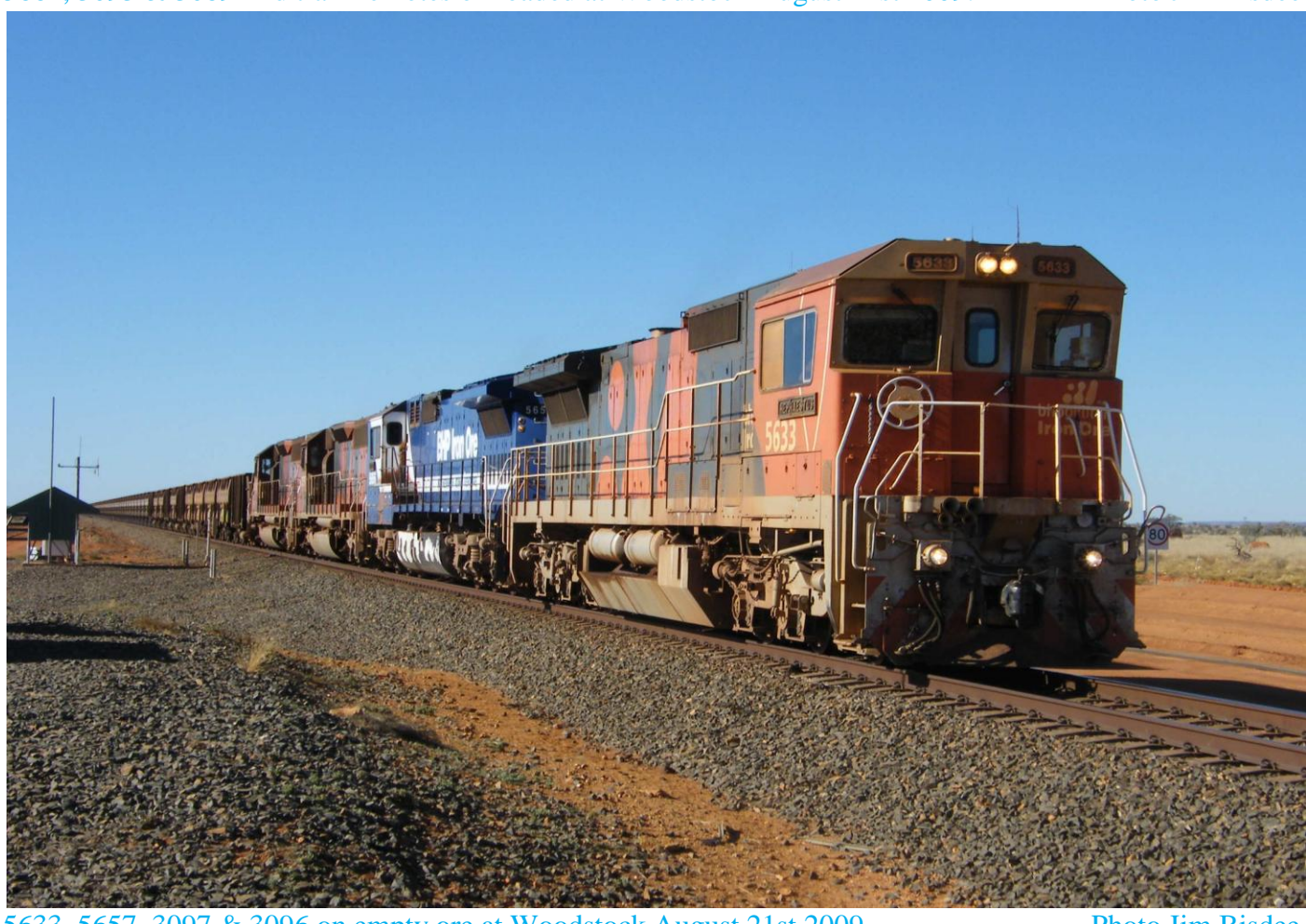
5633, 5657, 3097 & 3096 on empty ore at Woodstock August 21st 2009.