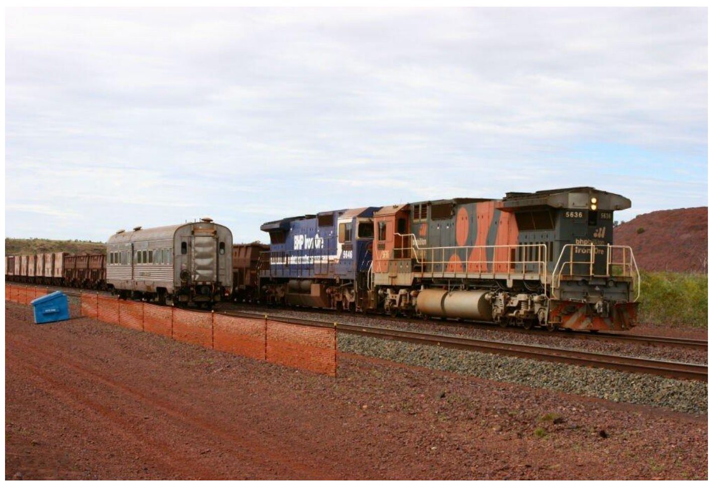
5636 & 5646 on loaded ore at Goldsworthy Sundowner car in loop June 25th 2005.