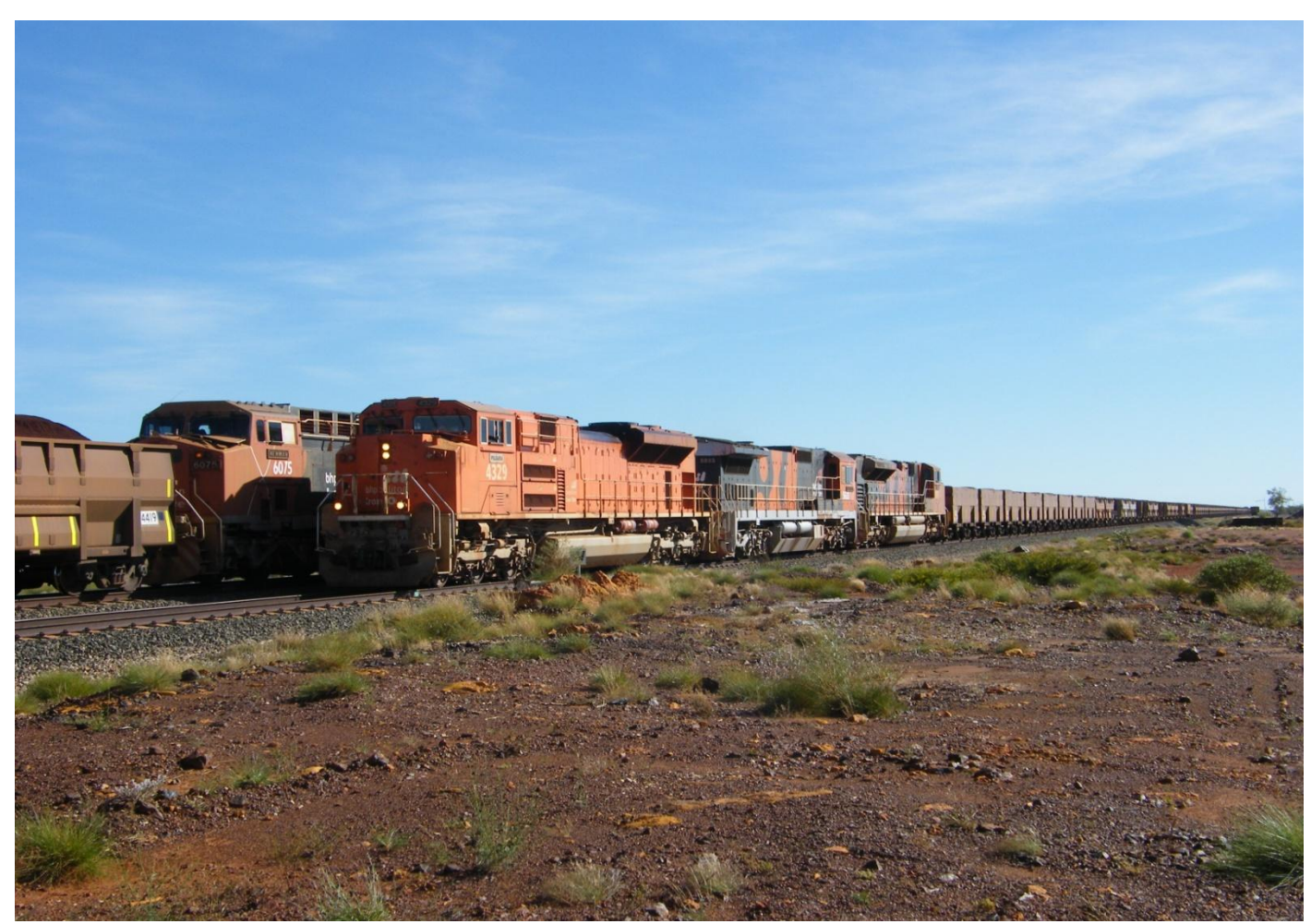
4329, 5633 & 4303 empty ore cross 6075 second dpu on loaded at Tabba June 20th.