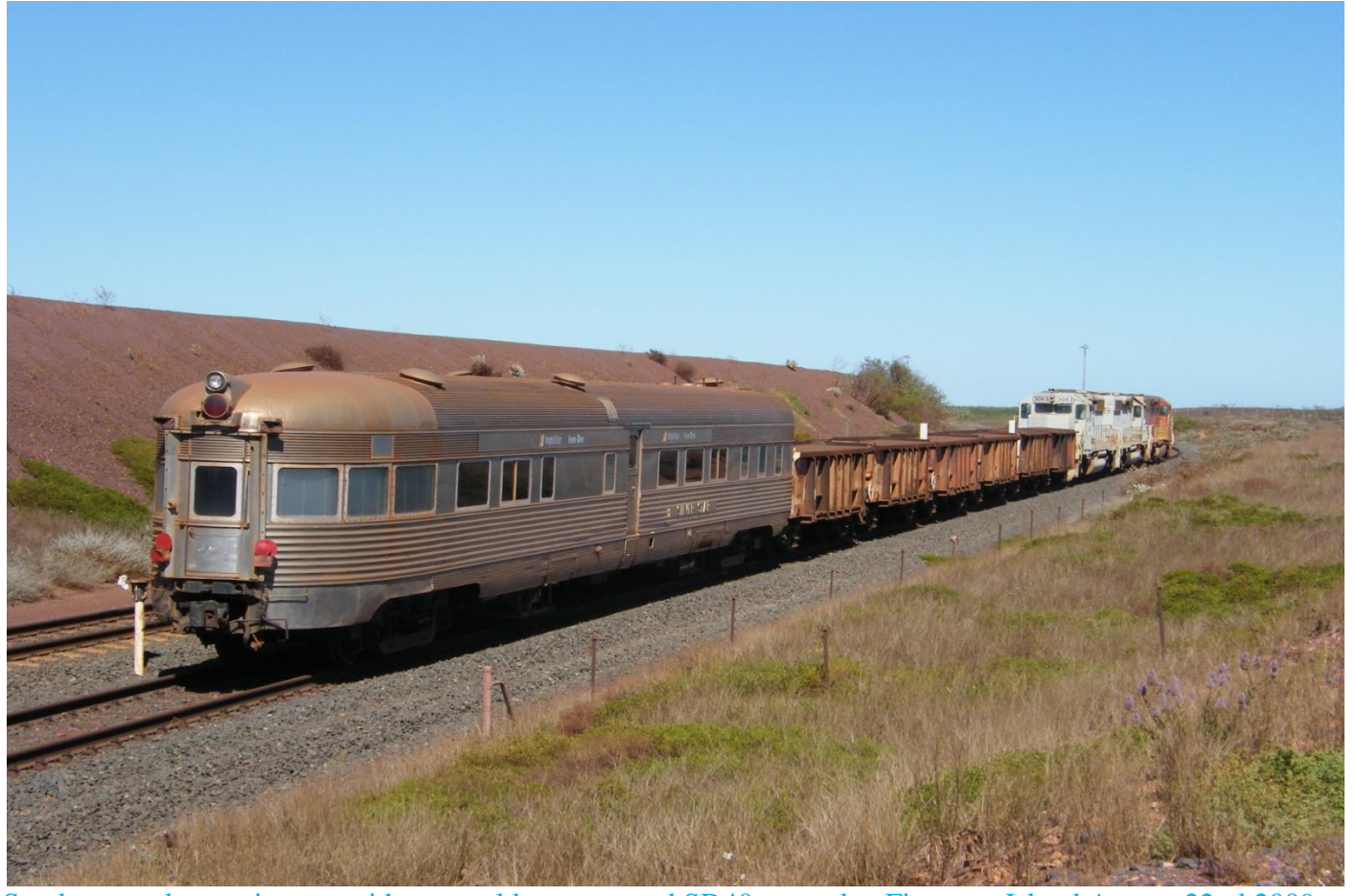
Sundowner observation car with some old ore cars and SD40s stored at Finucane Island August 22nd 2009.