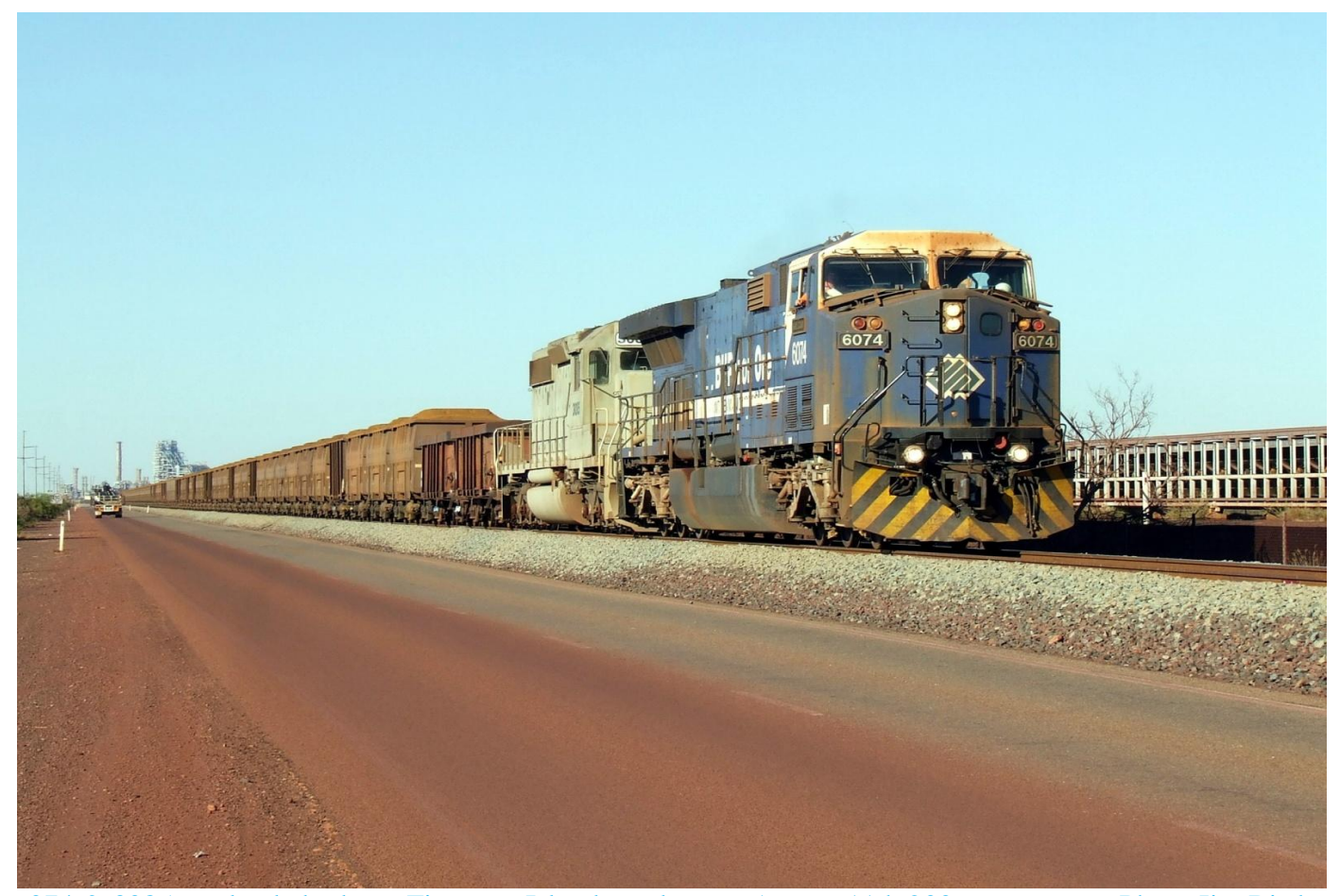
6074 & 3085 run loaded rake to Finucane Island car dumper August 11th 2006.