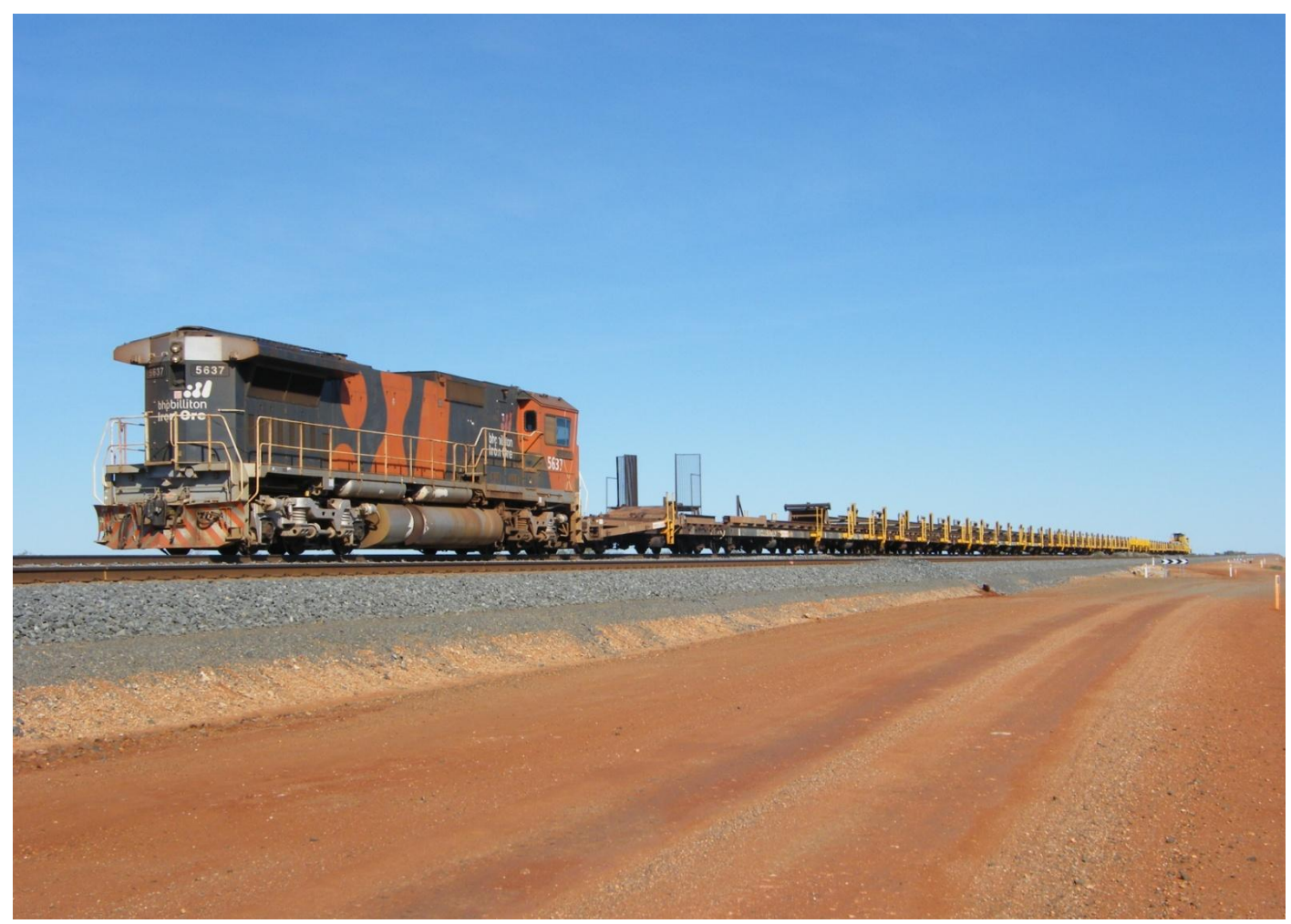
5637 on rail train recovering old rail on Mt Newman main at Mooka on June 19th 2011.