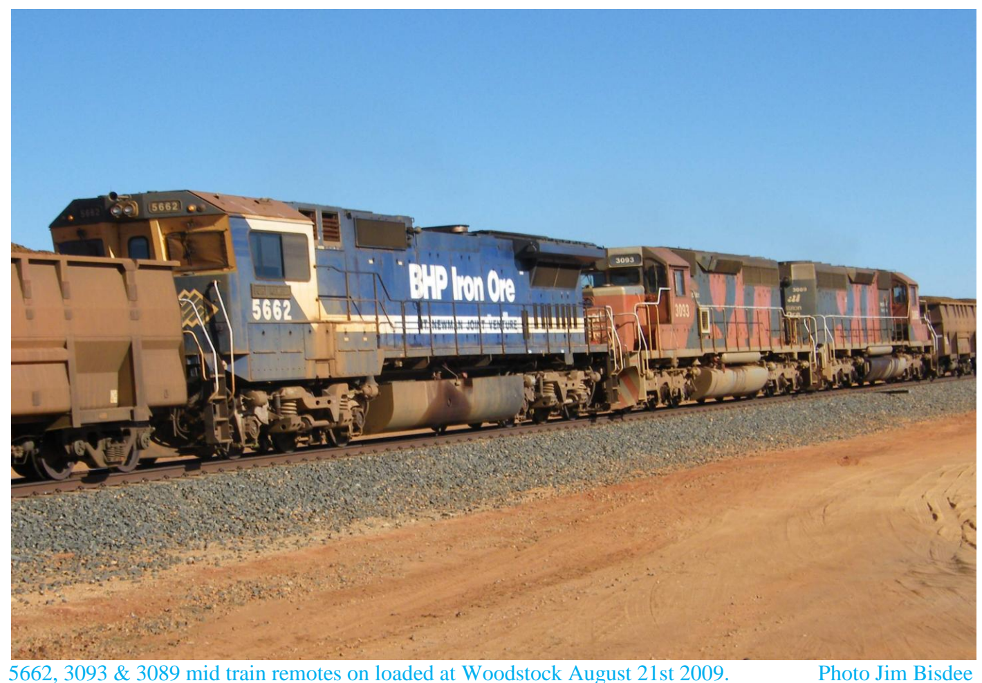
5662, 3093 & 3089 mid train remotes on loaded at Woodstock August 21st 2009.