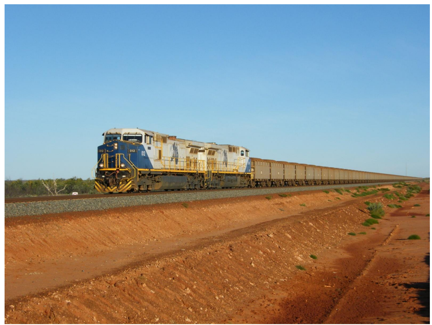
012 & 014 on loaded ore at Barker loop on June 19th 2011.