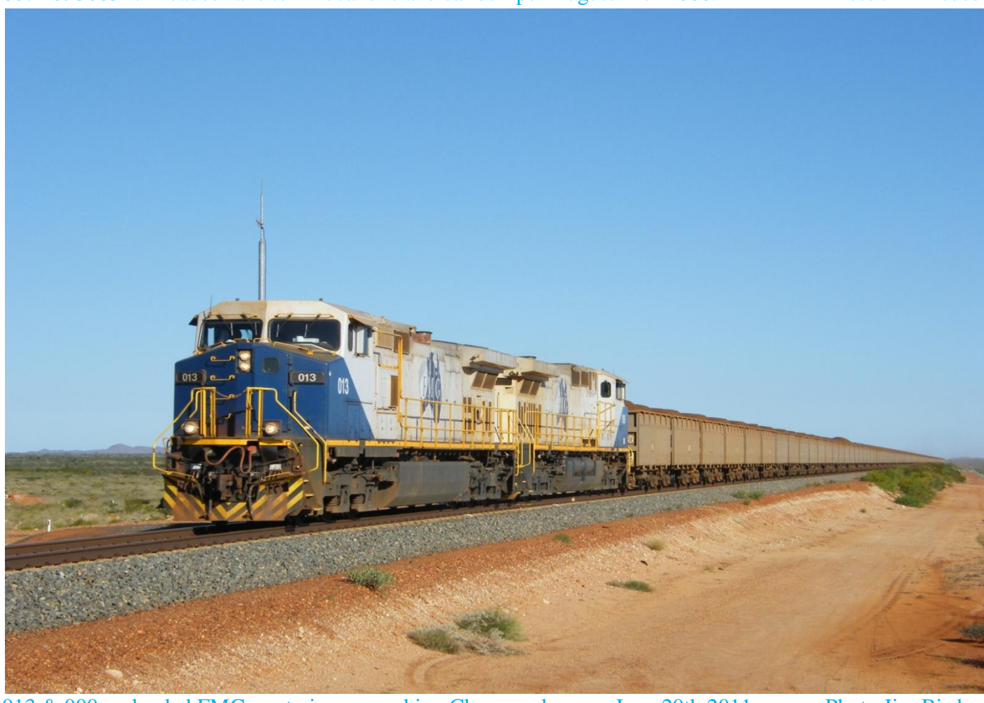
013 & 000 on loaded FMG ore train approaching Chapman loop on June 20th 2011.