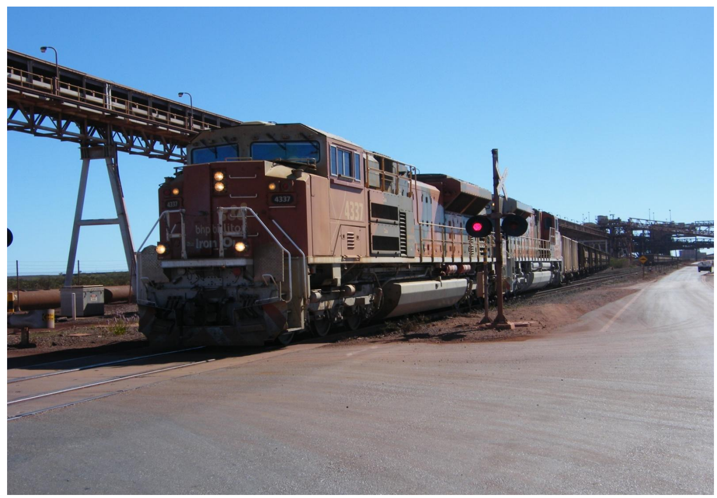
4337 & 4354 on empty ore rake departing Finucane Island dumpers August 22nd 2009.