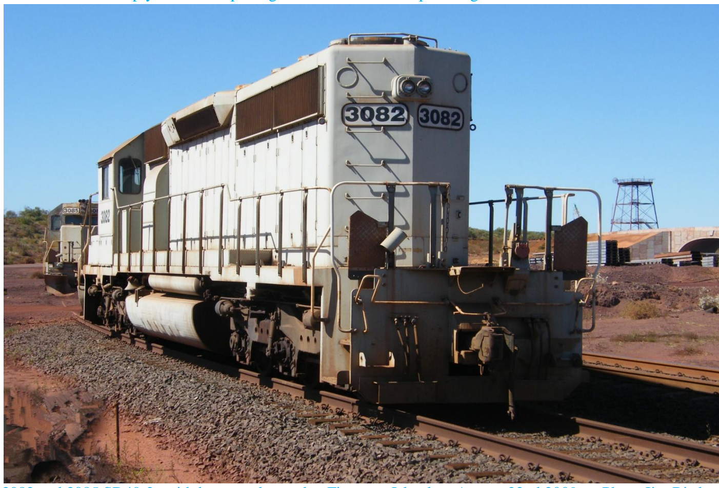
3082 and 3085 SD40-2s withdrawn and stored at Finucane Island on August 22nd 2009.