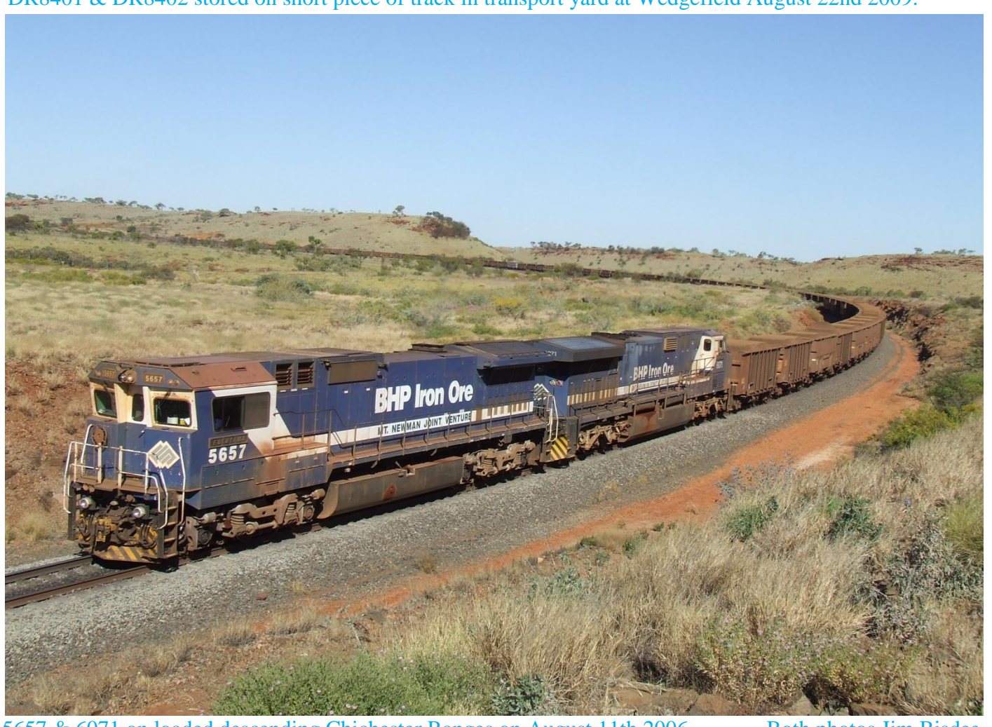
5657 & 6071 on loaded descending Chichester Ranges on August 11th 2006.