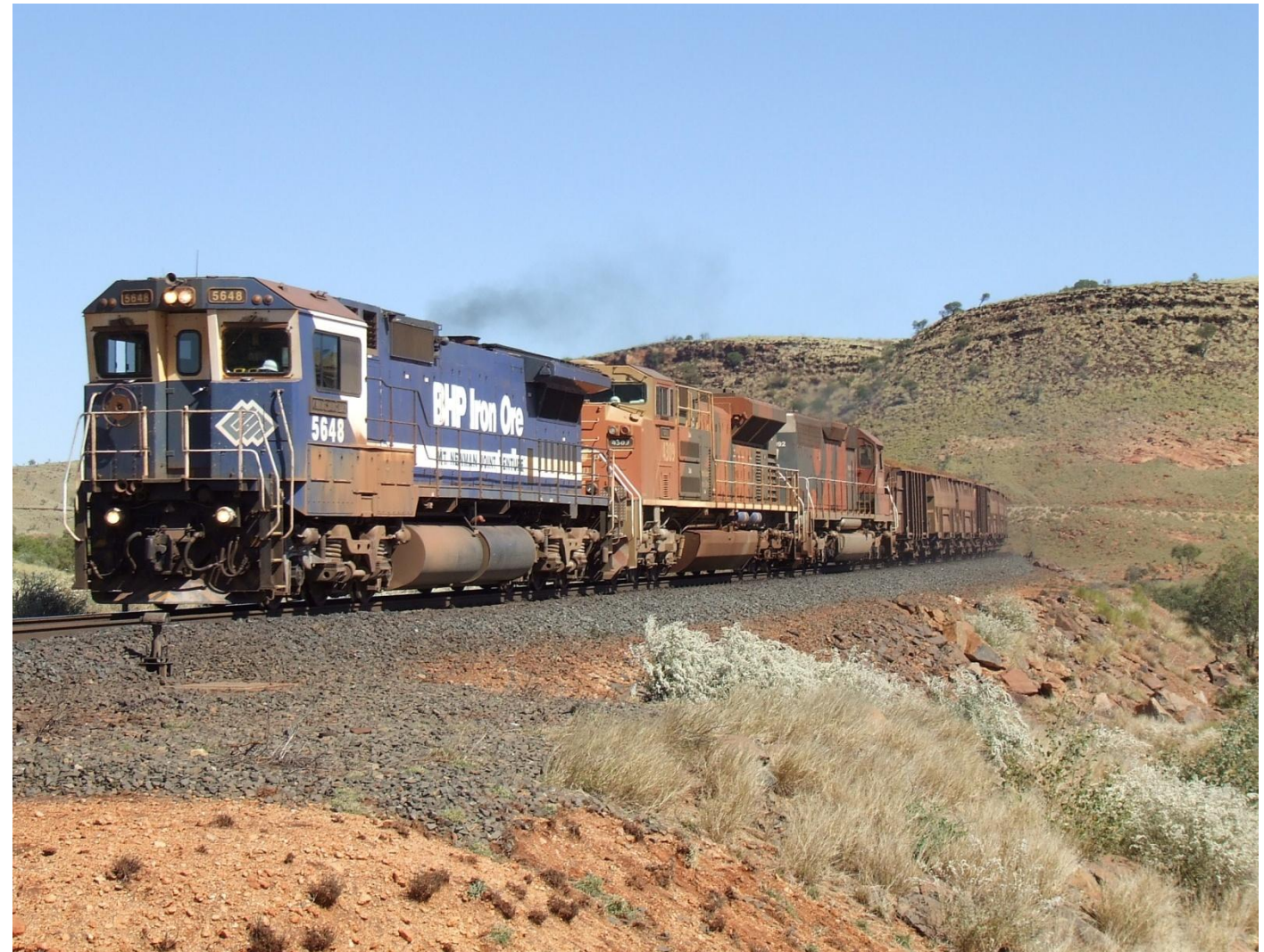
5648 CM40-8M, 4309 SD70ACel/c & 3092 SD40R three different types of locomotives run loaded ore train through Garden in Chichester Ranges on August 11th 2006. Photo Jim Bisdee

follow West Australian Railscene e-Mag on facebook Copyright Jim Bisdee © 2011 WWW.WESTERNRAILS.COM