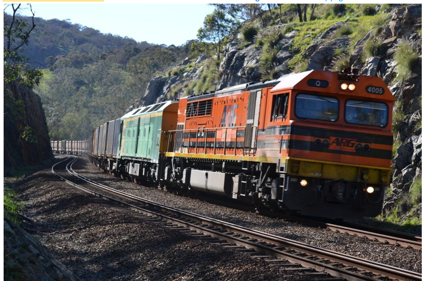
Q4005 & ALZ3208 run 6430 empty sulphur through #1 cut Brigadoon August 6th.

West Australian Railscene e-Mag is published weekly by Jim Bisdee on rail happenings on West Australian Railroads WWW.WESTERNRAILS.COM follow West Australian Railscene e-Mag on facebook Copyright Jim Bisdee © 2011