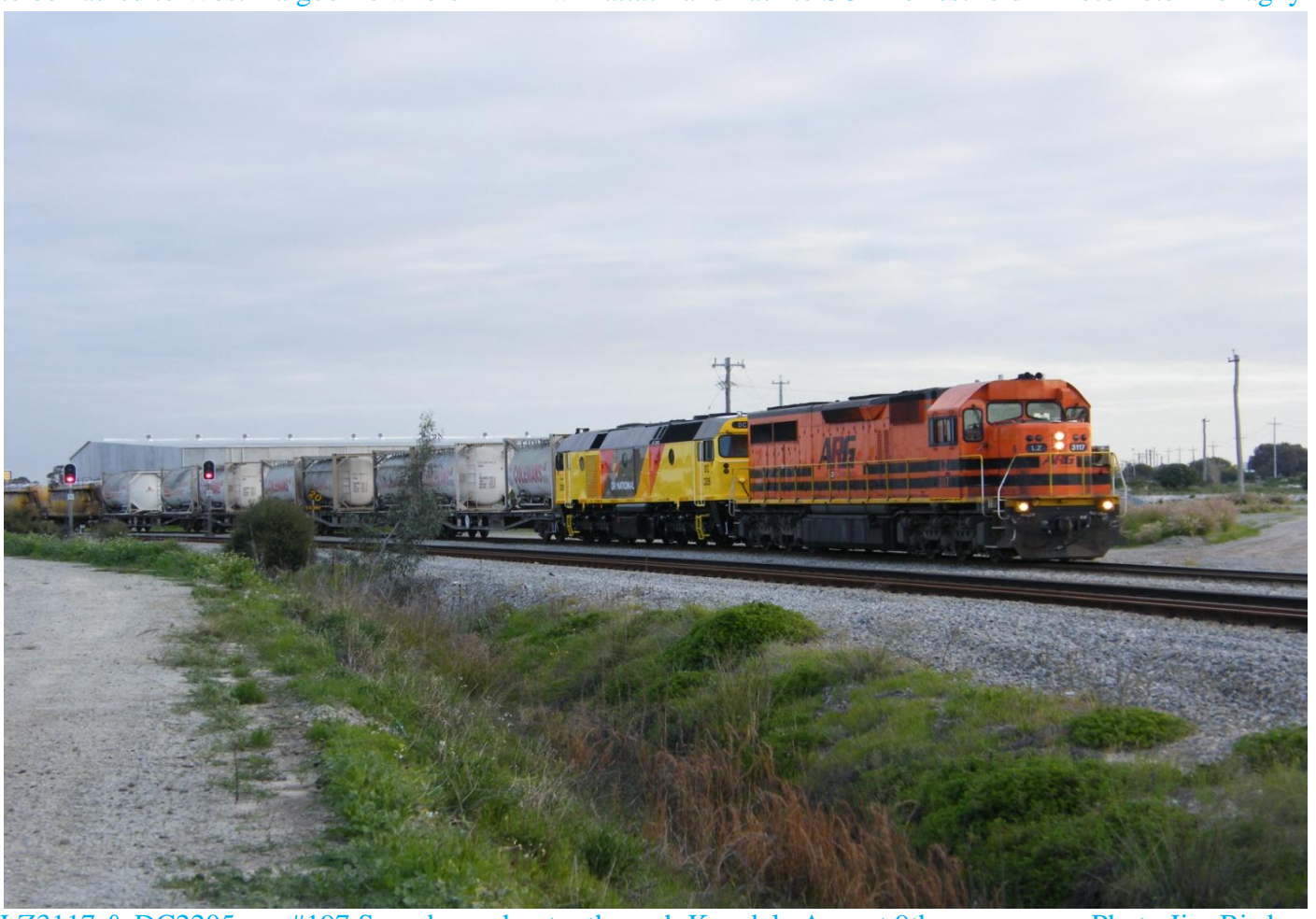
LZ3117 & DC2205 run #197 Soundcem shunter through Kewdale August 9th.