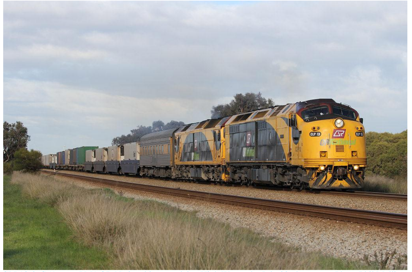
CLP13 & G516 on 6PM1 QR National intermodal at High Wycombe July 22nd.