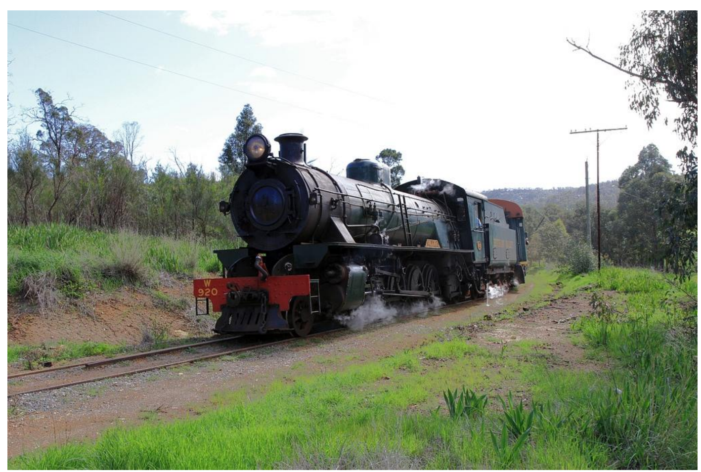
W920 on three car HVR steam special rounds curve at bottom crossing on Dwellingup line August 7th.