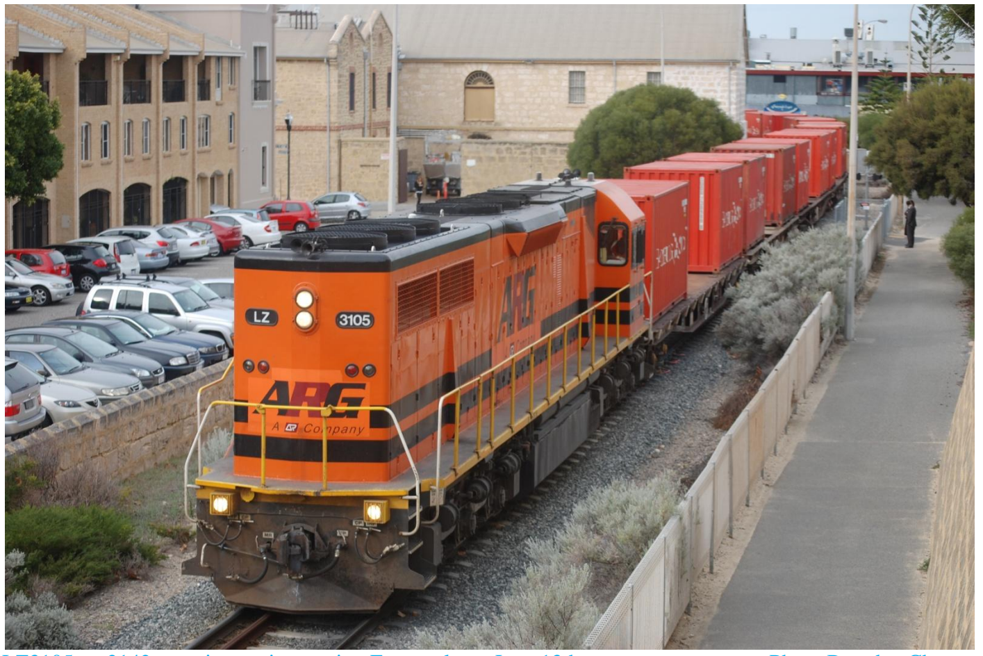
LZ3105 on 2142 container train entering Fremantle on June 13th.