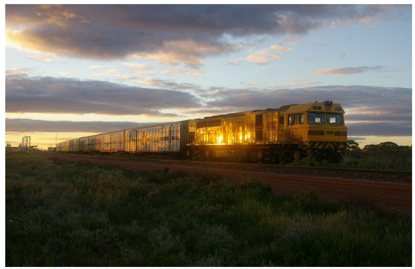
Q4014 on 4C73 Parkston shunter shunts SCT wagons from Engineers siding along the loop on August 10th to be hauled to West Kalgoorlie where 2MP1 will attach and haul to SCT Forrestfield