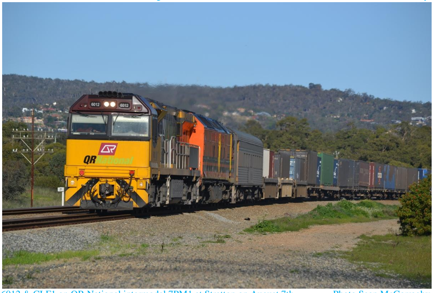
6012 & CLF1 on QR National intermodal 7PM1 at Stratton on August 7th.