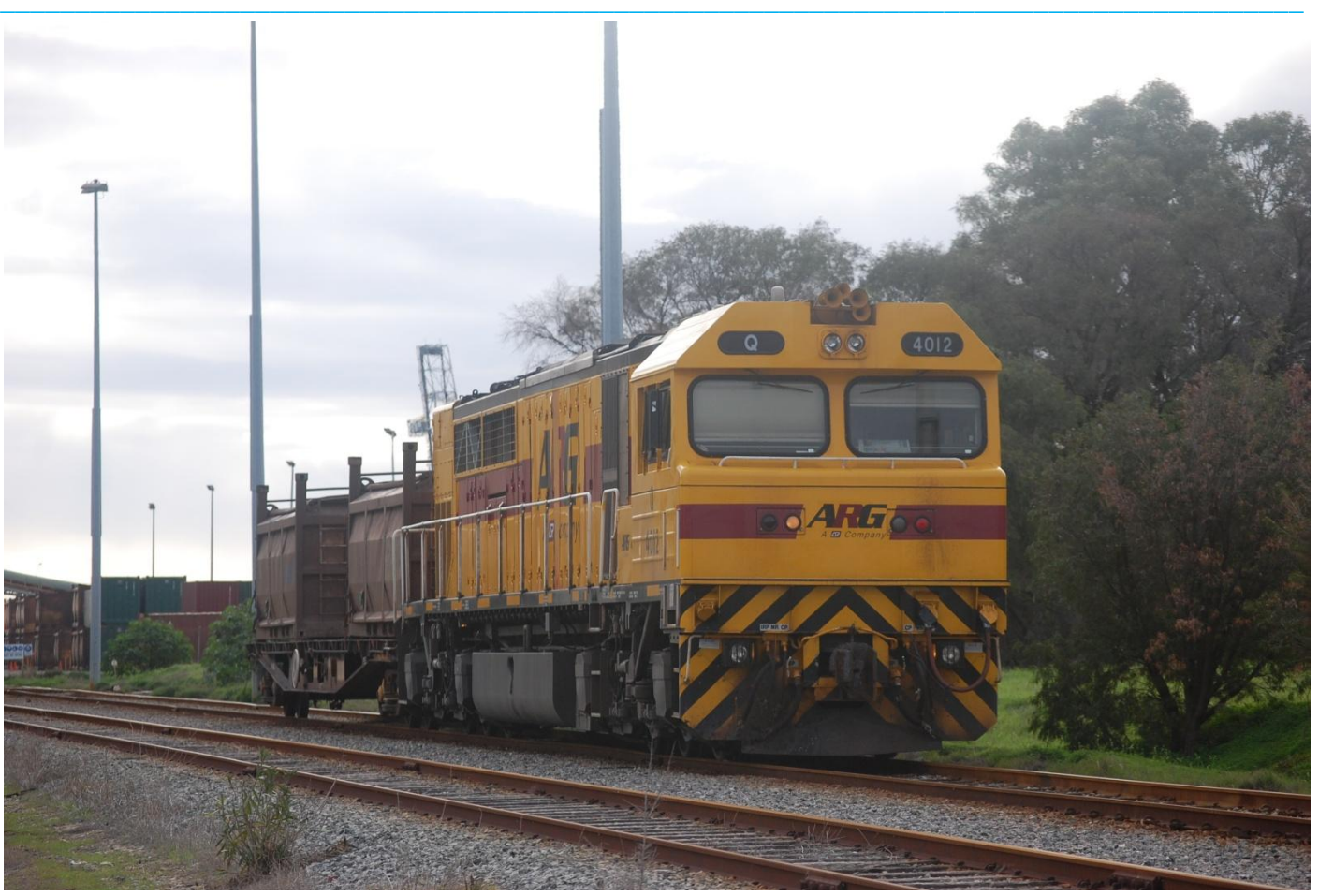
Q4012 with one flattop and containers at Brambles siding Kwinana June 26th.

Former Australian National coal wagons that were converted to APOY ore cars were removed from use some years ago are again seeing service on Koolyanobbing ore trains that will require the services with APOY cars to have them attached on rear of loaded trains. This will cause more ore trains to run into West Kalgoorlie to have the locomotives run round the train so these cars positioned on the rear for loading.