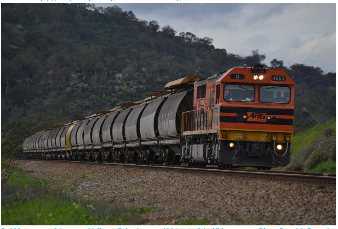
Q4003 runs out of the Avon Valley at Brigadoon on 4056 grain July 27th.