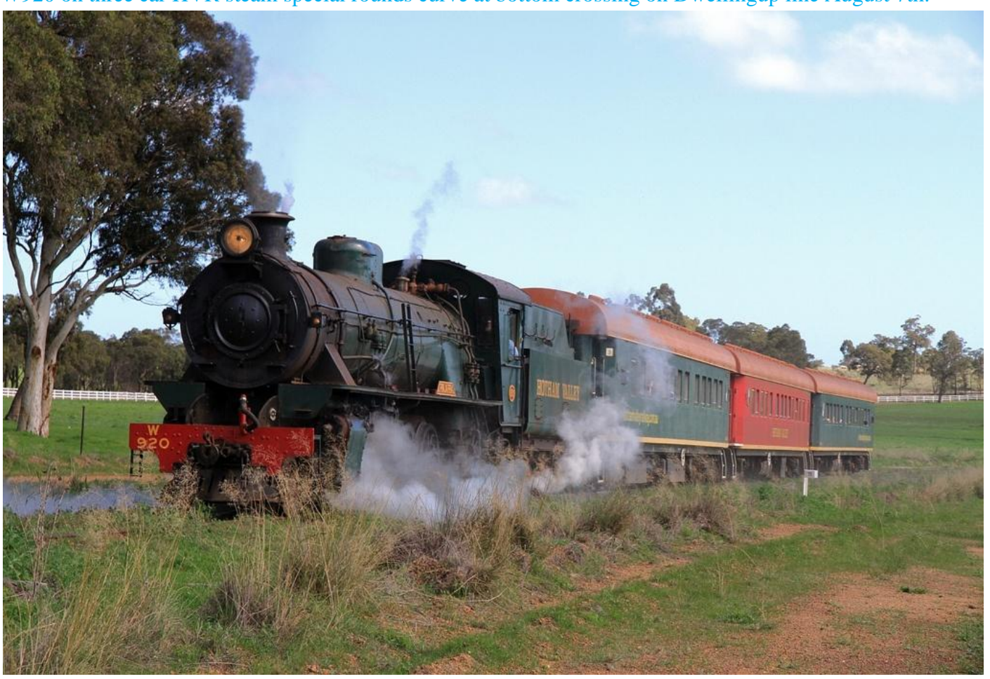
W920 climbing the grade out of Isandra towards Brookdale on August 7th.