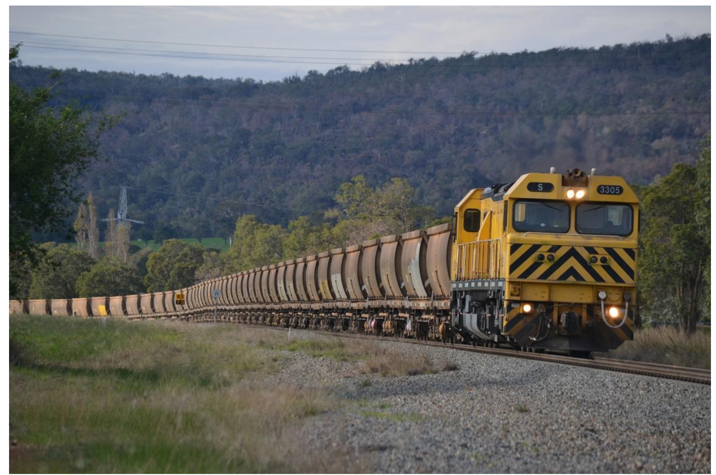
S3305 on empty bauxite climbs the grade through North Dandalup July 24th.