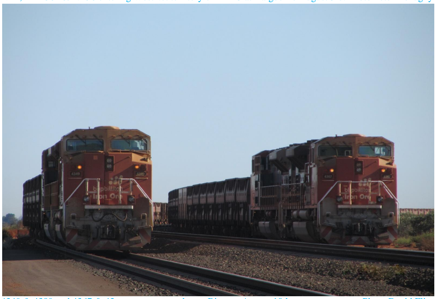
4349 & 4309 and 4367 & 43- on empty car rakes at Bing on August 10th.