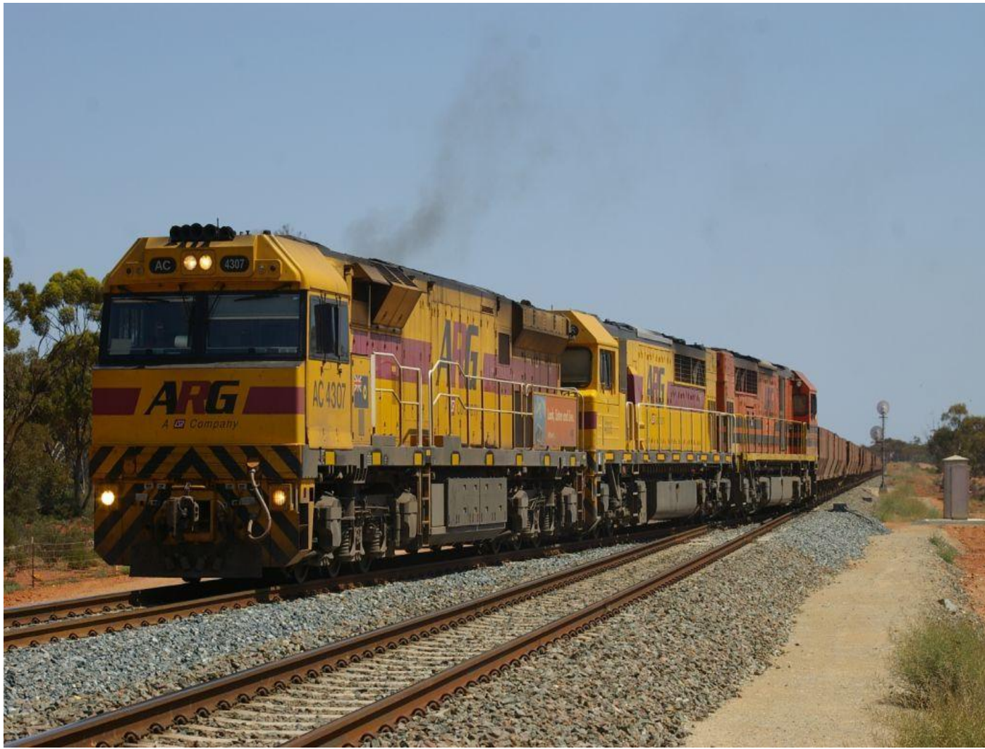
AC4307, Q4006 & Q4005 on loaded ore train crossing over from EGR main line onto the Binduli triangle to access line to Esperance and unloaders some 400km to the south October 15th.

Tier 3 York Quairading and West Merredin Trayning lines are seeing some track work and spot sleeper replacement take place for about two weeks from October 18th. This work is to bring the lines back to an accepatble standard to enable running grain trains over the comming season. Extra work is being undertaken at Trayning to rebuild the line following flood damage sustained earlier in the year.