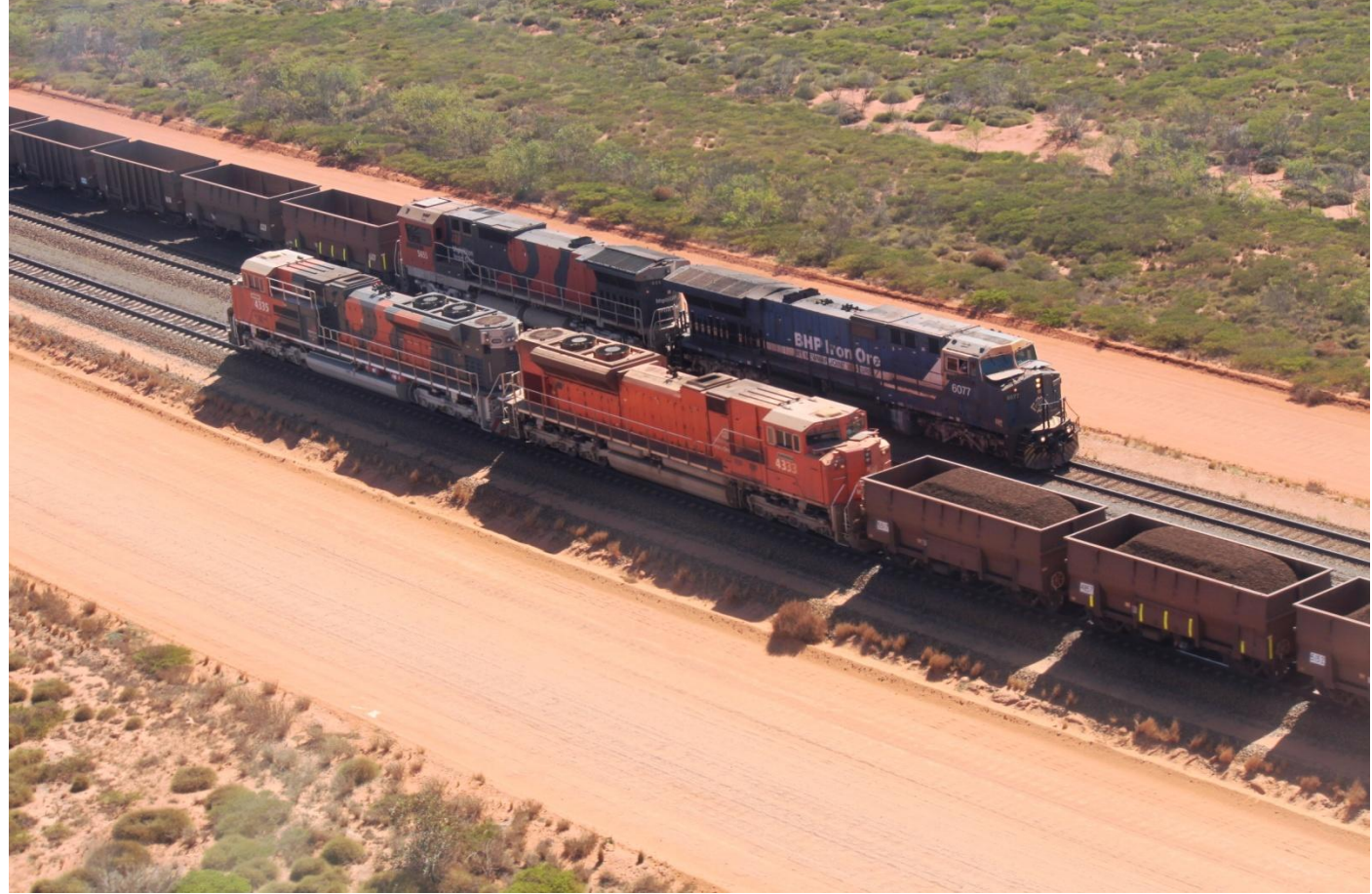
4335 & 4333 SD70ACes on loaded ore train crossing 6077 AC6000W & 5655 CM40-8M on empty at Bing that has all BHPBIO locomotive types in service in this aerial shot October 15th. Photo Baden Tidd

Issue number 160October 24th 2011free electronic railway magazineWWW.WESTERNRAILS.COMfollow West Australian Railscene e-Mag on facebookCopyright Jim Bisdee © 2011