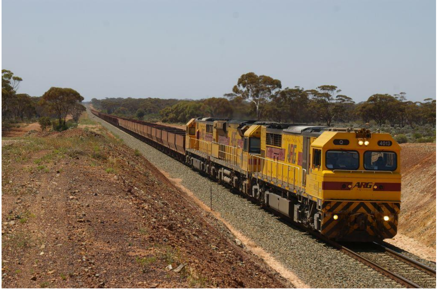
Q4013, AC4305 & Q4014 on empty ore train at 628km on EGR line October 15th.