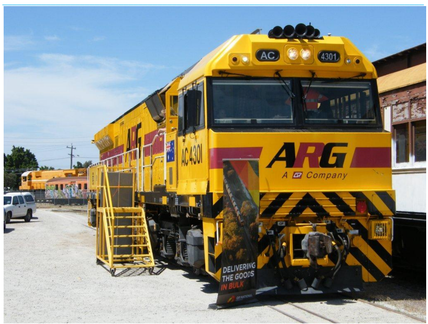
AC4301 on exhibition at Rail Heritage WA Museum Bassendean on October 16th.

Queensland National again made a locomotive available for display at Rail Heritage WA Railfest held at RHWA Museum on October 16th. AC4301 ran 1155 light engine from Forrestfield to Bassendean before the opening returning later in the afternoon. This year QR National has kindly provided locomotives at both of the RHWA open days giving an optunity for poeple to see a modern locomotive close up. This is a great gesture to the WA community not often seen by railroads in Australia now.