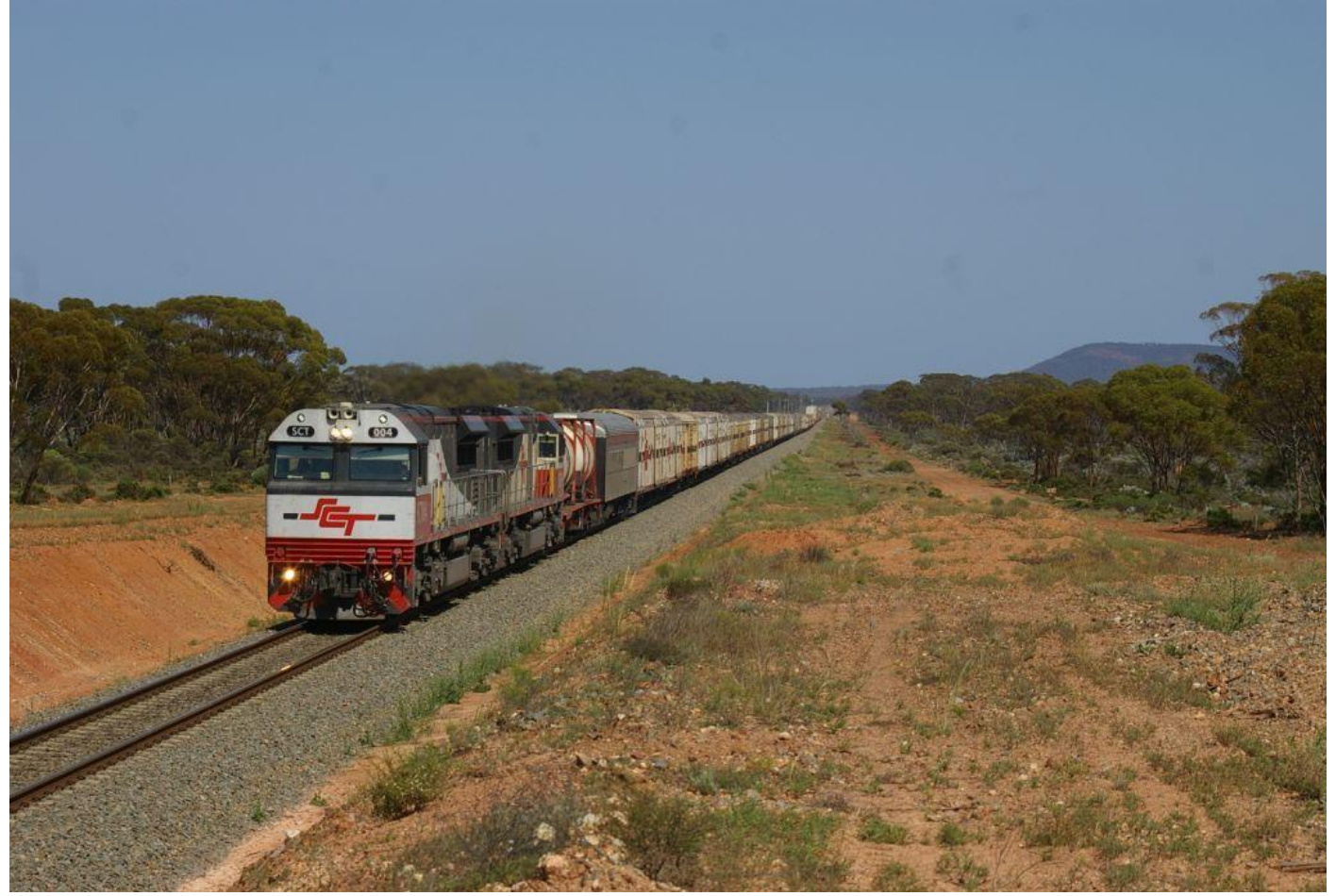
SCT004 & SCT on 6PM9 block vans at 628km peg on October 15th.