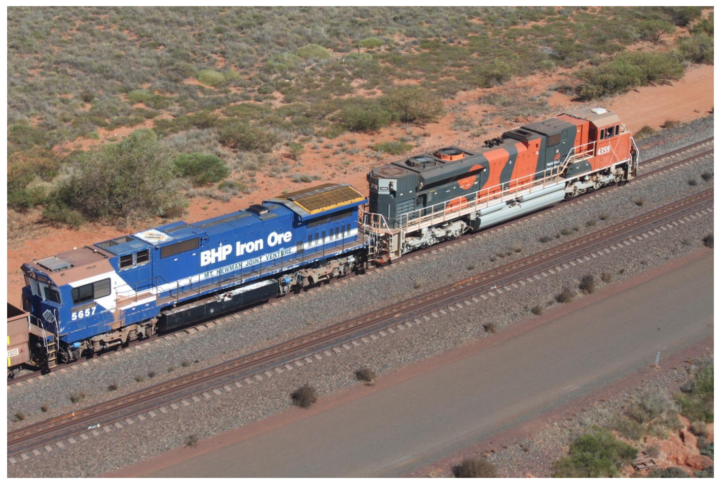
4359 & 5657 on empty departing Bing for the mines on October 15th.