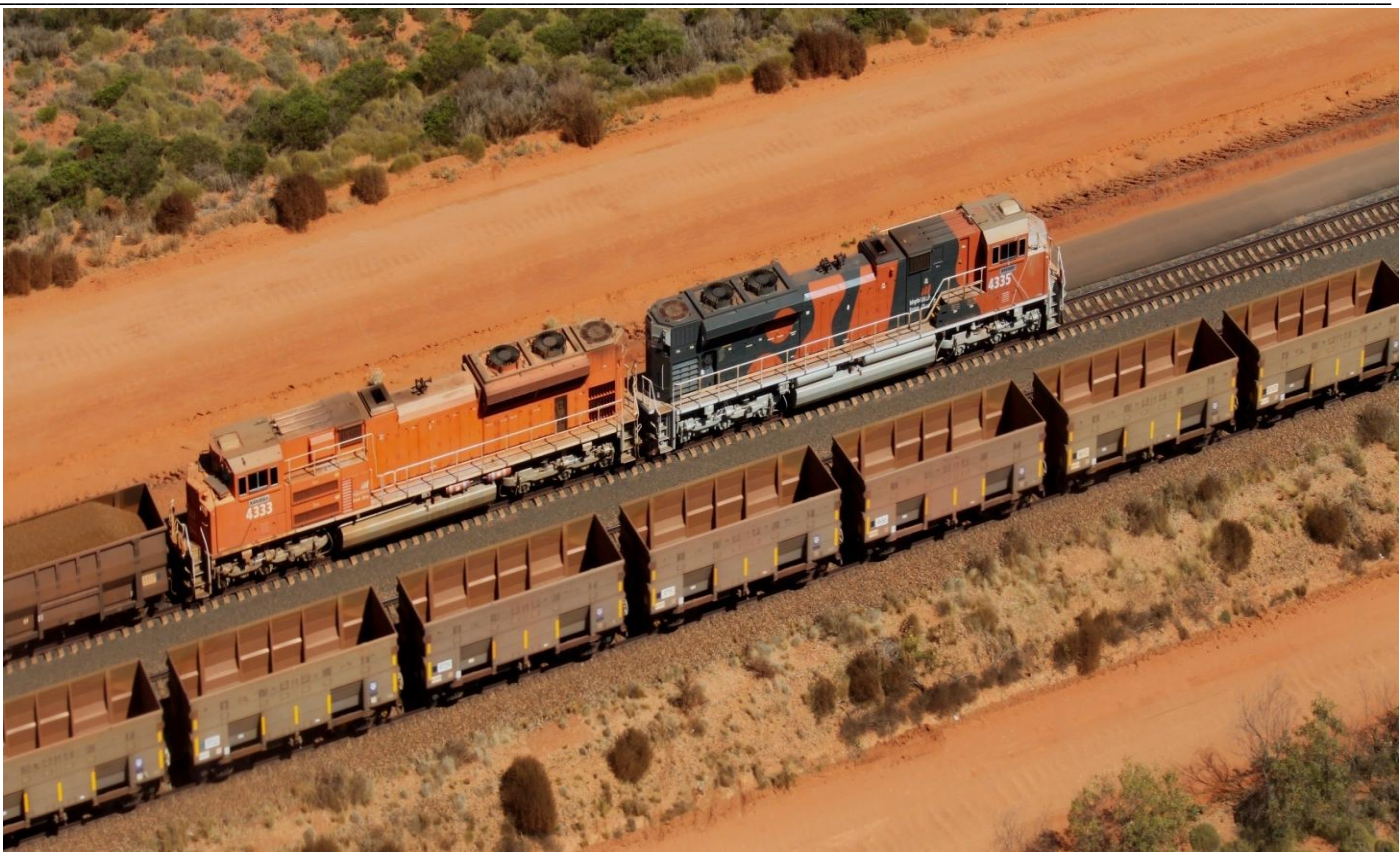
4335 & 4333 on loaded ore train passing empty ore rake at Bing October 15th.

Esperance ore haulage has been suspended for some two weeks to allow upgrading of dumpers at Port of Esperance from October 20th. The four ore car rakes were stabled at various loops with 4414 on the baloon loop at Koolyanobbing and the locomotives running light engine to Kalgoorlie, 4416 was stabled on loop at Higginsville with light engines also running back to Kalgoorlie. 5414 rake was stabled at Grass Patch while fourth rake was stabled at Esperance. Three locomotives are to remain at Esperance for maintenance with the remaining locomotives from the ore train fleet to undergo maintenance at Kalgoorlie or Forrestfield.