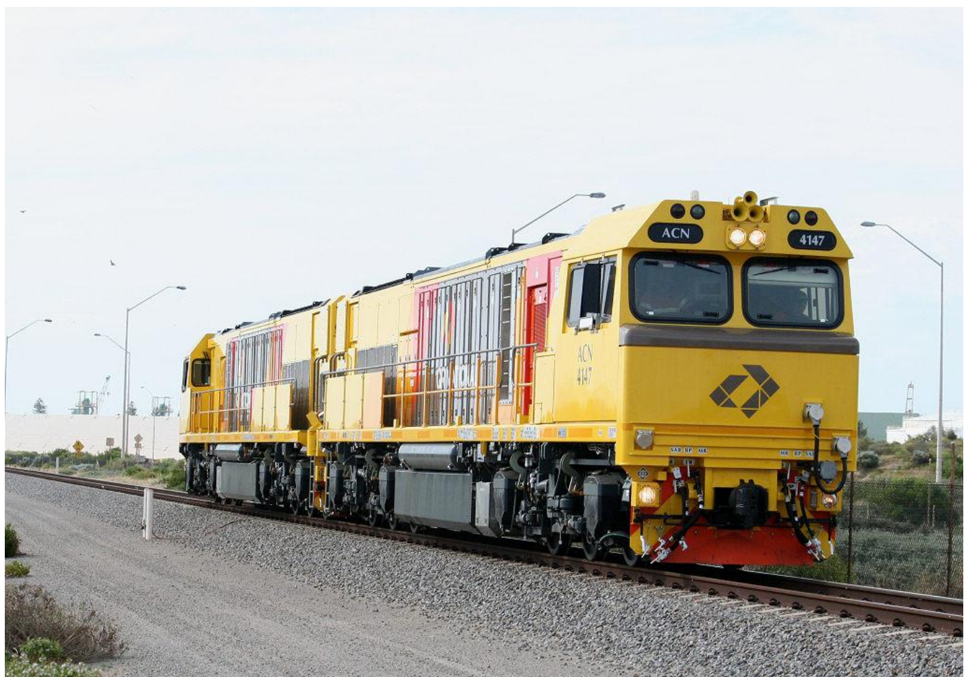
ACN4147 & ACN4148 undertaking crew training on the line from Narngulu Port of Geraldton running through Speration Point on October 21st.