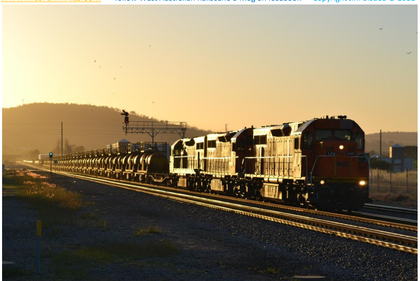
LZ3109, LZ3120 & LQ3121 run 3426 freight October 19th at Midland with the now rare sight of LZ class locomotives hauling this overnight train from Kalgoorlie.

<u>WWW.WESTERNRAILS.COM</u> follow West Australian Railscene e-Mag on facebook Copyright Jim Bisdee © 2011