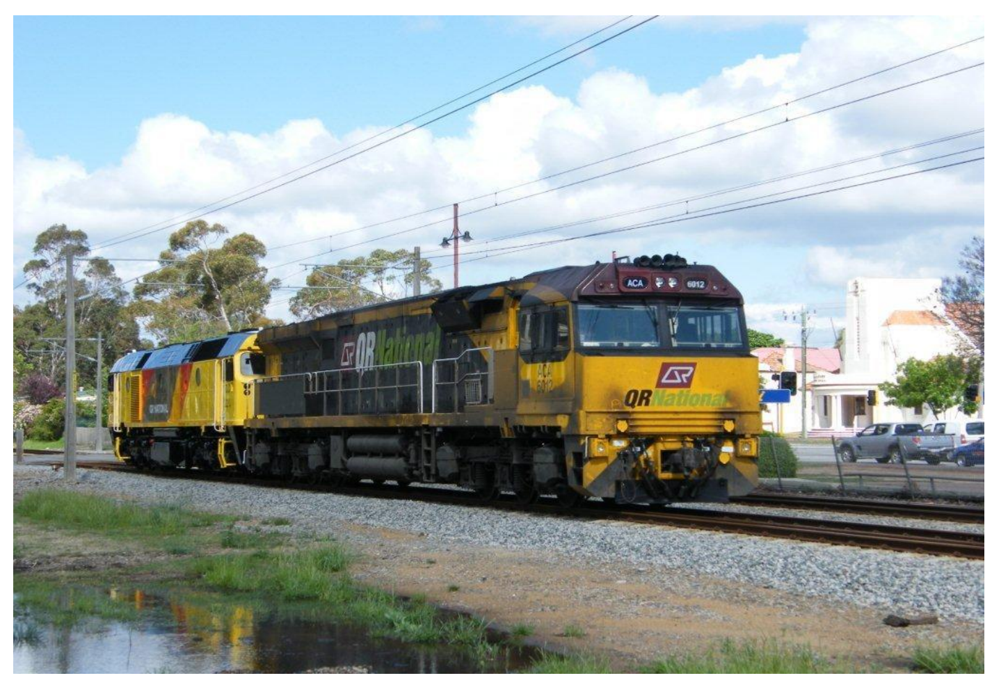
DC2213 & ACA6012 on 5154 light engines to Forrestfield at Guildford October 27th.