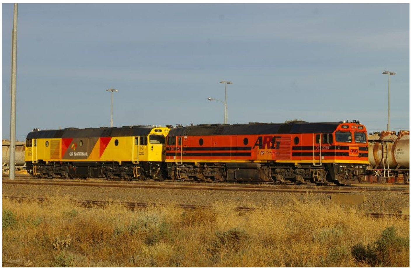
DC2205 & DC2215 stabled in West Kalgoorlie yard on October 21st.