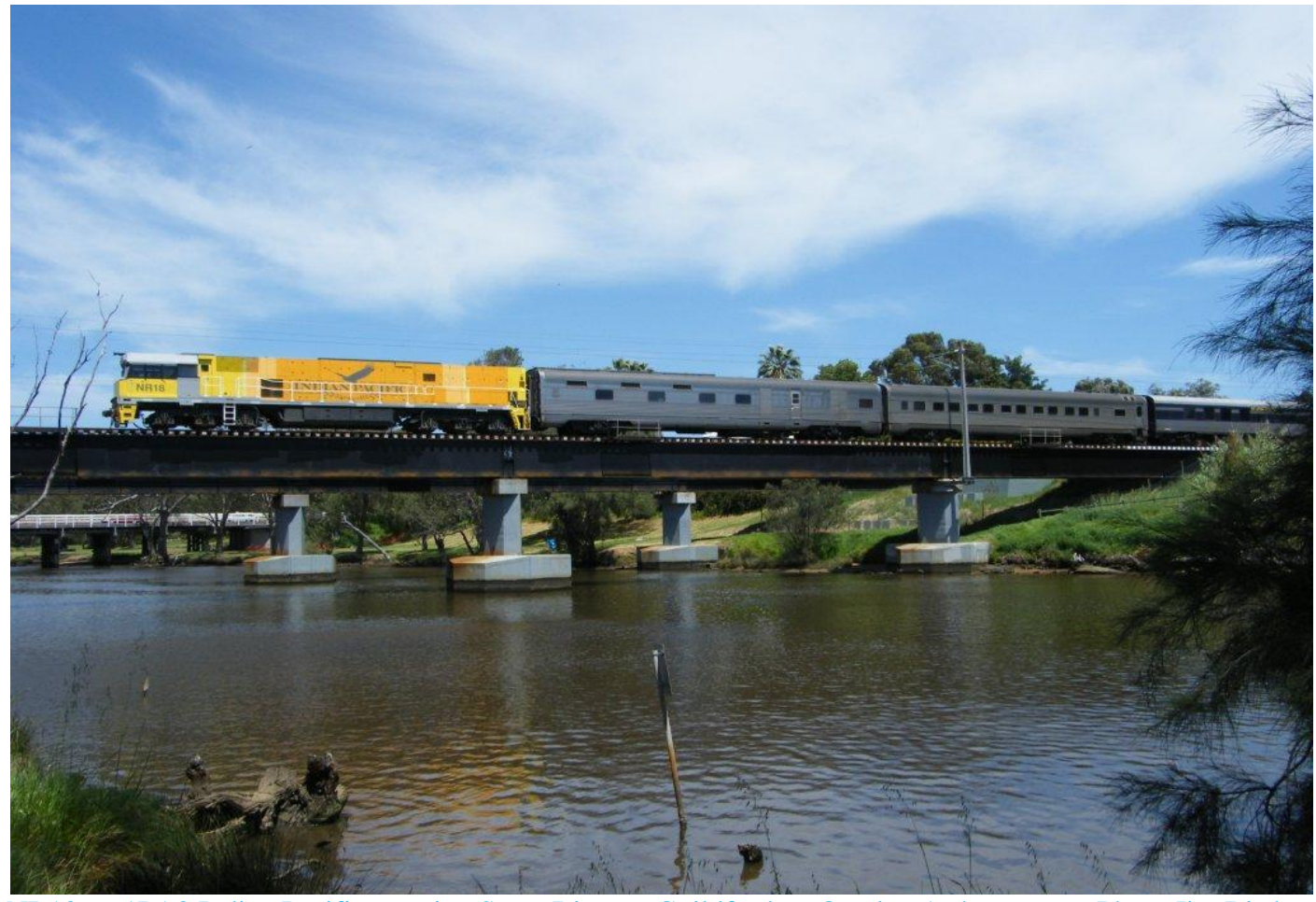
NR18 on 1PA8 Indian Pacific crossing Swan River at Guildford on October 16th.