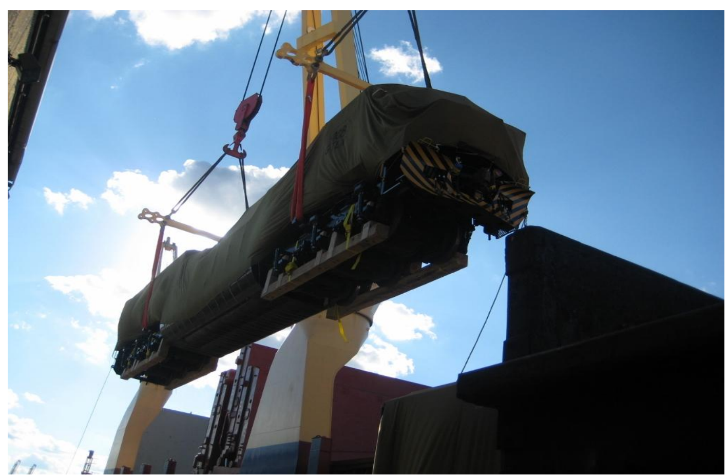
FMG 908 being loaded onto BBC Congo at Norfolk VA on October 14th.