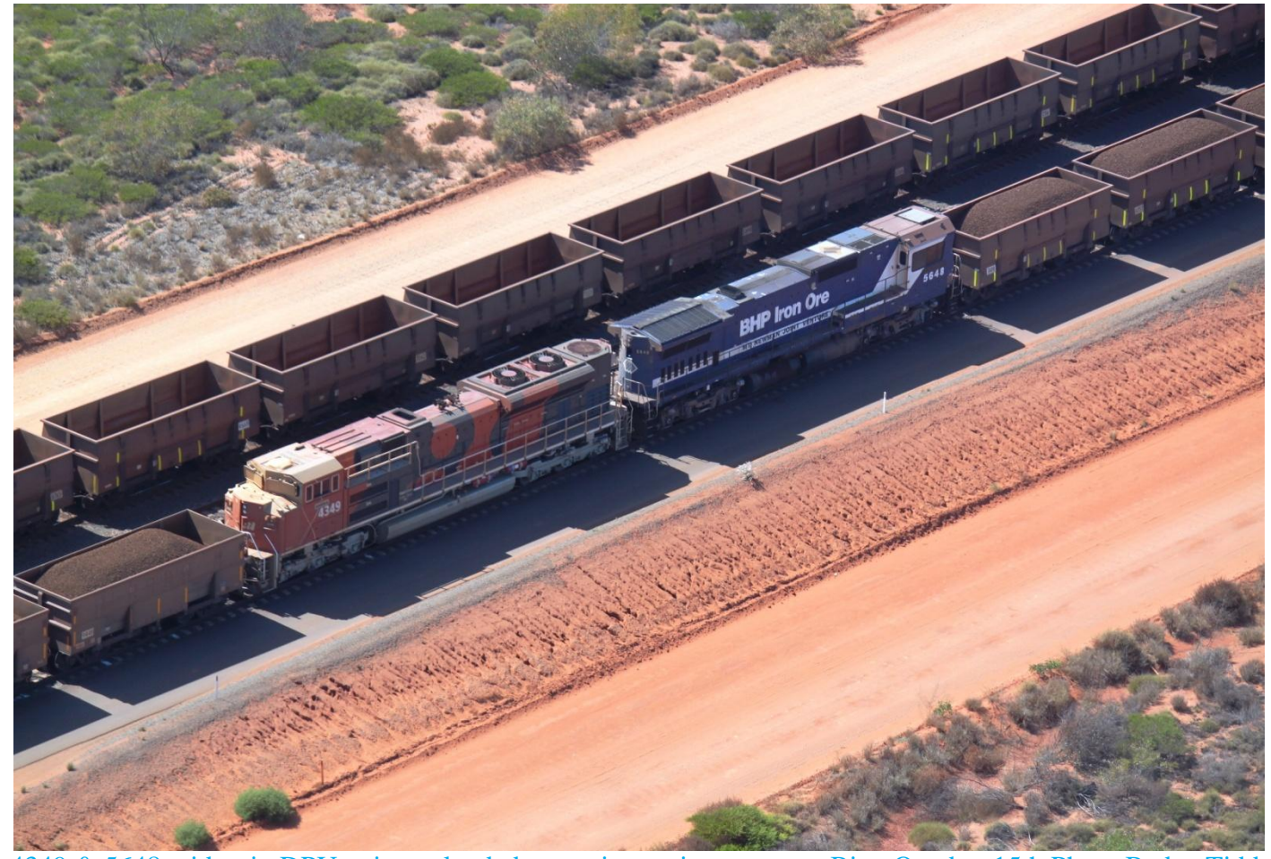
4349 & 5648 mid train DPU units on loaded ore train passing empty at Bing October 15th.

Q4019, AC4308 & Q4001 on 5430 empty sulphur October 21st at Windmill Hill.