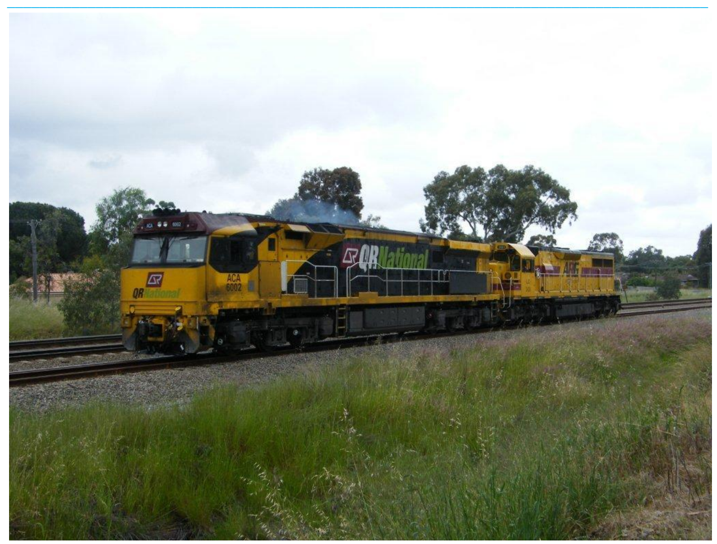
LQ3121 & ACA6002 on 4154 light engines at Woodbridge on October 26th.

COGHM [Commonwealth heads of Govenment Meeting] was held in Perth October 28th, 29th and 30th with the CBD in near lockdown in a massive security operation. Usual Queens Birthday holiday was moved from October 3rd to 28th to ease disruption to the city centre. Travel on all public transport was free on both 28th and 29th. A massive BBQ was held on mid morning on October 29th the Esplanade on Perths foreshore as last engagement for Queen Elizabeth on this trip to Australia. With parking in Perth nearly non existent and free public transport trains on all lines were very well patronised. Passengers from Mandurah alighted at Perth Esplanade, Clarkson line Perth Underground, Midland and Armadale lines at McIver and Fremantle line Perth City station. Boarding was a simular pattern for the 100,000 people that attended.