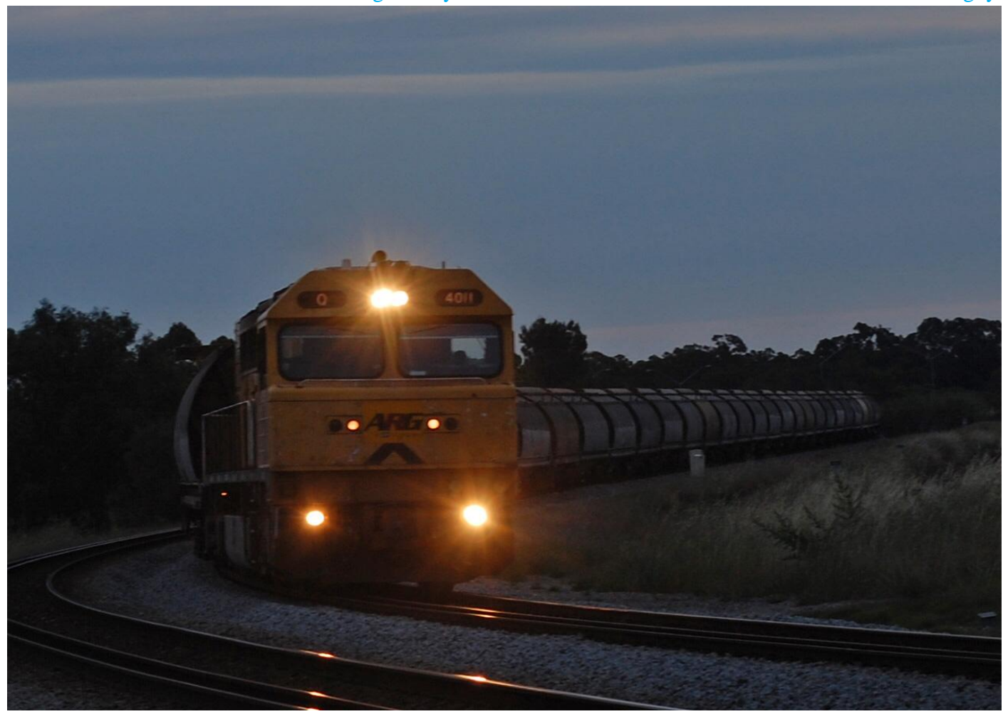
Q4011 on 2055 empty grain about to go under Welshpool Road Bridge October 24th.