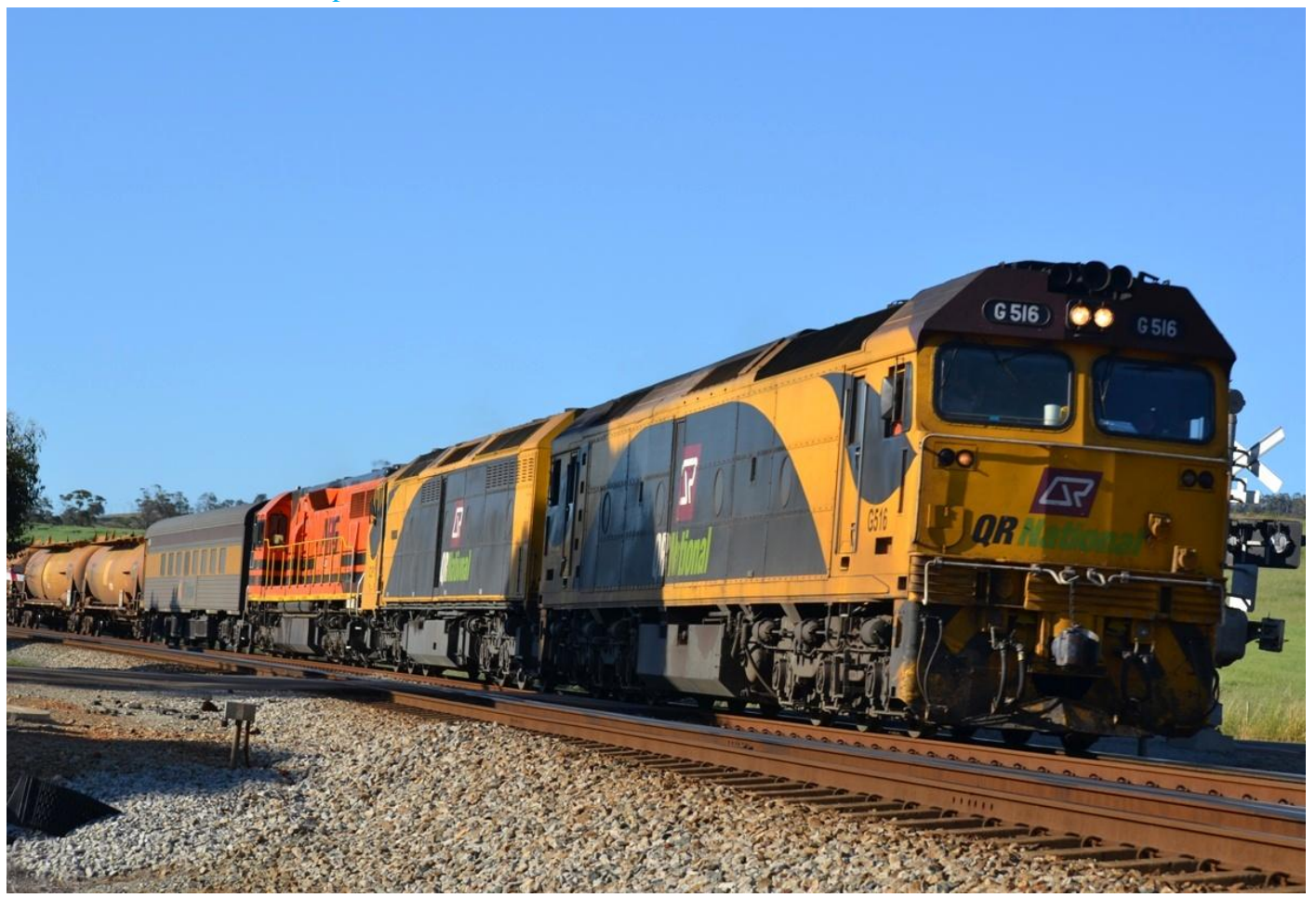
G516, CLP11 & LZ3105 run QRN intermodal 3MP1 at Toodyay October 21st.