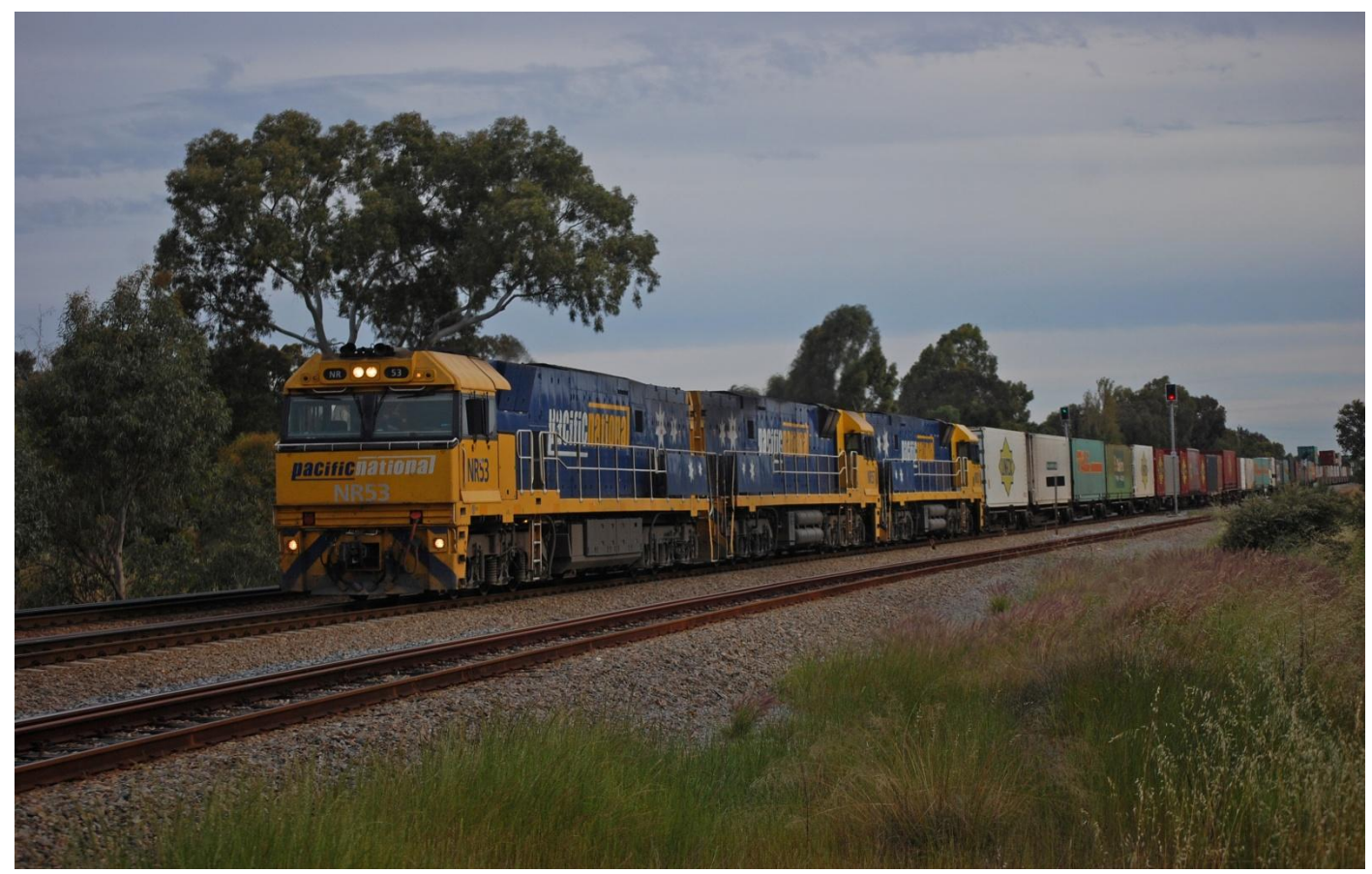
NR53, NR57 & NR21 on 2PM5 at Woodbridge intermodal at dusk on October 24th.