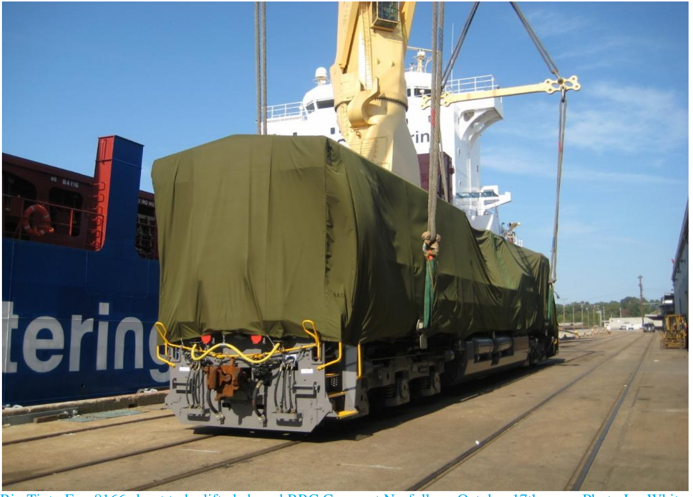
Rio Tinto Evo 8166 about to be lifted aboard BBC Congo at Norfolk on October 17th.

NR8 standing on the loop at Parkeston beside NR5 on 6SP6 where third unit NR8 had just been detached to run light engine to back Zanthus to rescue failed 6MP5 on October 23rd.