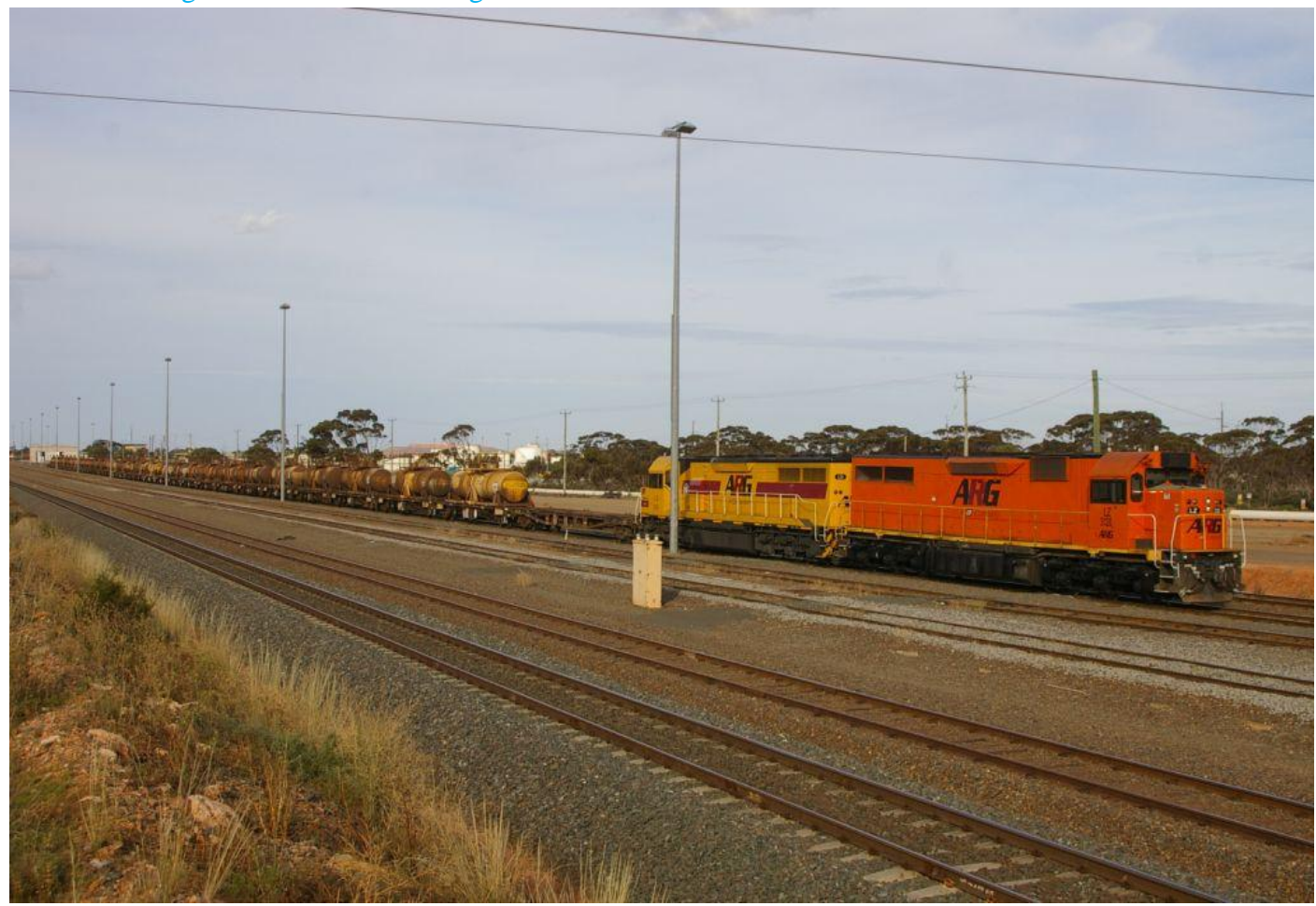
LZ3120 & LQ3121 on acid tankers for 3426 freight in West Kalgoorlie yard on October 18th that will have LZ3105 attached to lead giving three Ls in three different liveries.