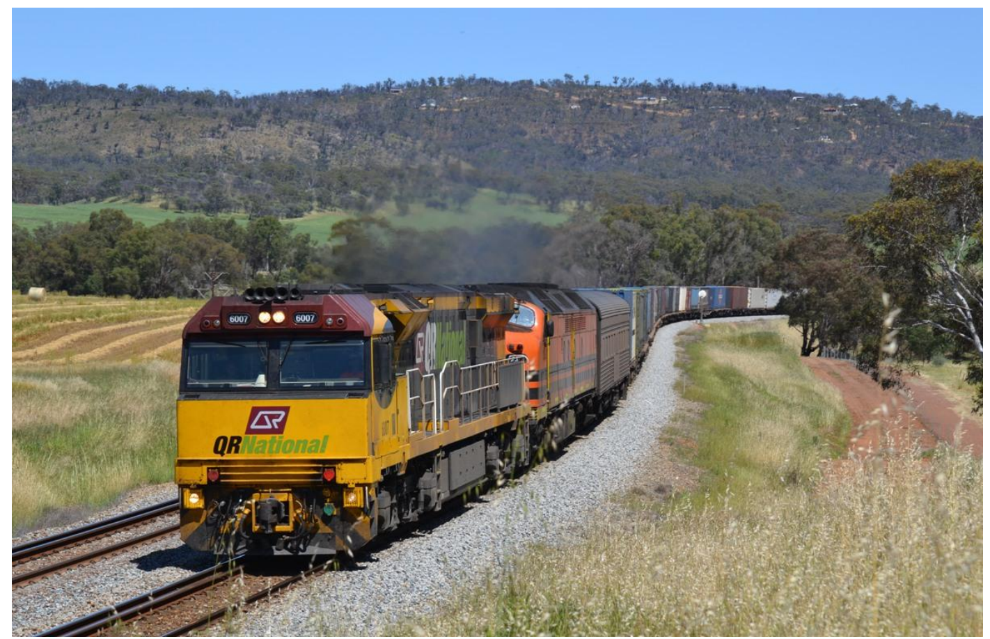
6007 & CLF2 on QRN 6PM1 at Donkey Crossing Toodyay on October 21st.