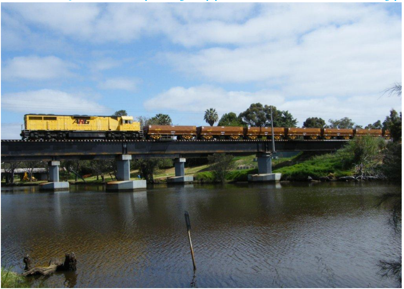
L3115 on 6154 shunter with new 20 WOE ore cars crossing Swan River on October 14th.