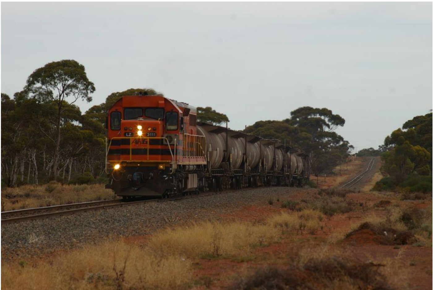
LZ3111 on 5442 tankers on roller coaster Leonora line a few kilometres north of Kalgoorlie December 1st this line only saw a train a week as narrow gauge in early 1970s.