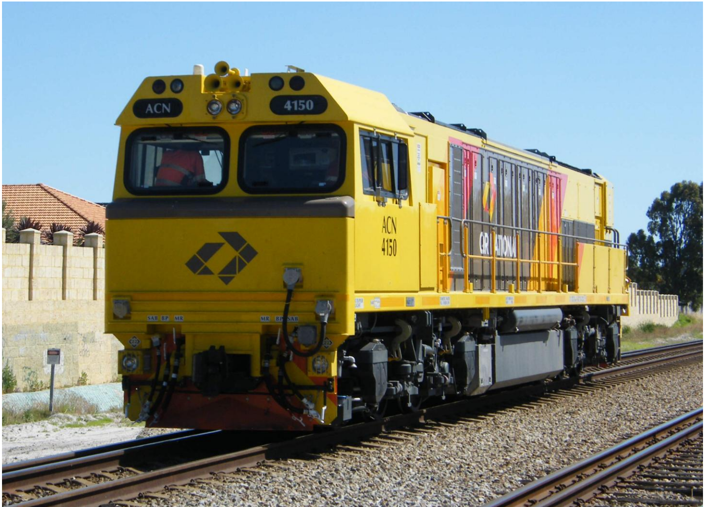
ACN4150 runs 4122 light engine trial to Kwinana at Thornlie November 30th.

Heavy lift ship BBC Congo arrived at Port of Dampier 0700 November 25th to anchor and wait a berth with one coming available on evening of 27th. The latest six General Electric ES44DCi locomotives 8166 to 8171 were unloaded during day on 28th and 29th November with BBC Congo then sailing for Port Hedland at 1600. These new locomotives are complete and on their bogies were hauled on 116 wheel floats the short distance from the port to 7 Mile workshop for commissioning.