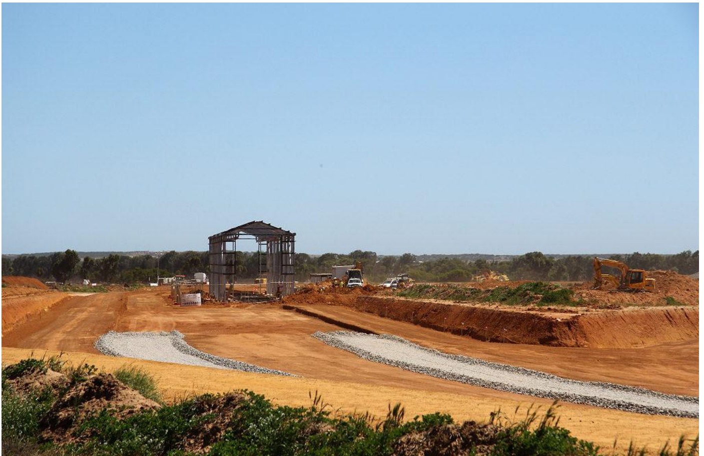
QR National new Narngulu East depot showing construction undertaken November 20th.