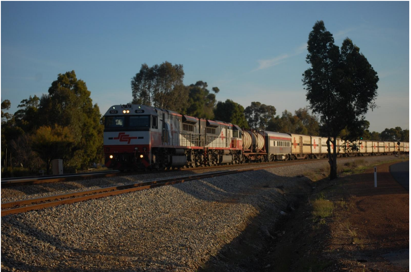
SCT001 & SCT008 on 1PM9 block vans at Millendon Junction November 20th.

DC2213 hauled ACB4404 to UGR Bassendean on 6154 shunter for commissioning modification to suit use in WA on December 2nd.