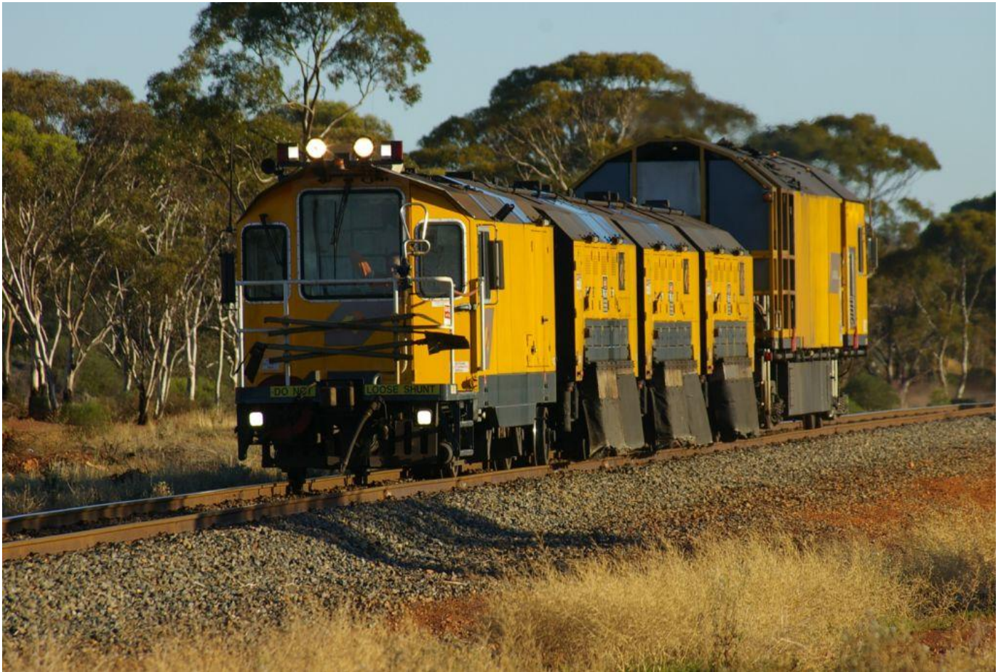
MMY32 QRN rail grinder on Leonora line just outside Kalgoorlie November 24th.