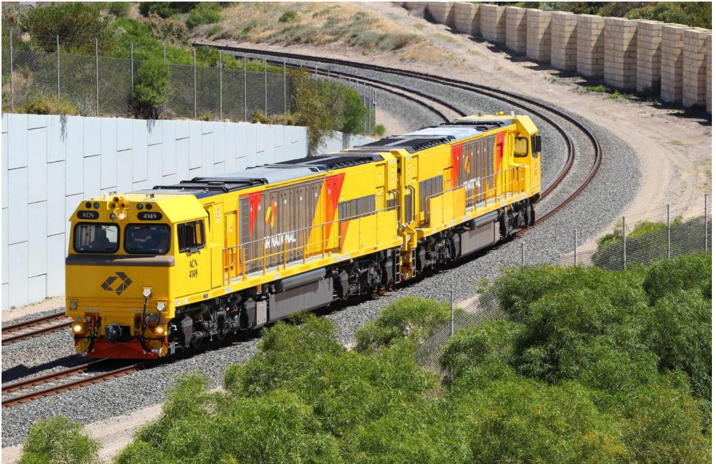
ACN4149 & ACN4147 driver training arriving at Geraldton Port November 28th.