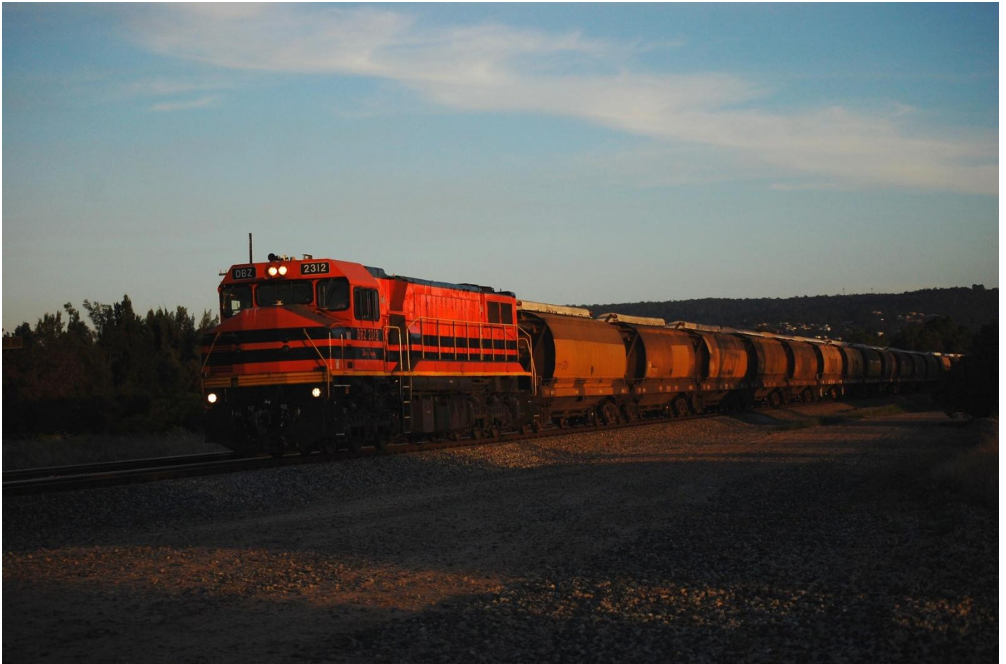
DBZ2312 runs grain train through Stratton at dusk on November 20th.