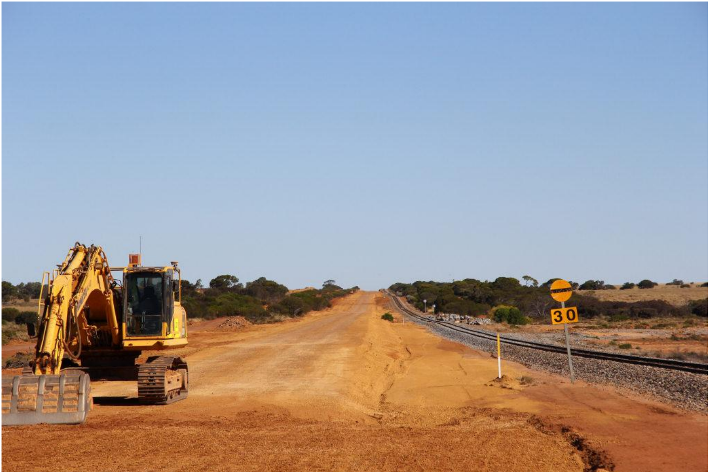
Earthworks are well advanced on new and improved rail formation next to existing Mullewa to Morawa railway at Dean Road Wilroy about 20km south of Mullewa November 20th.