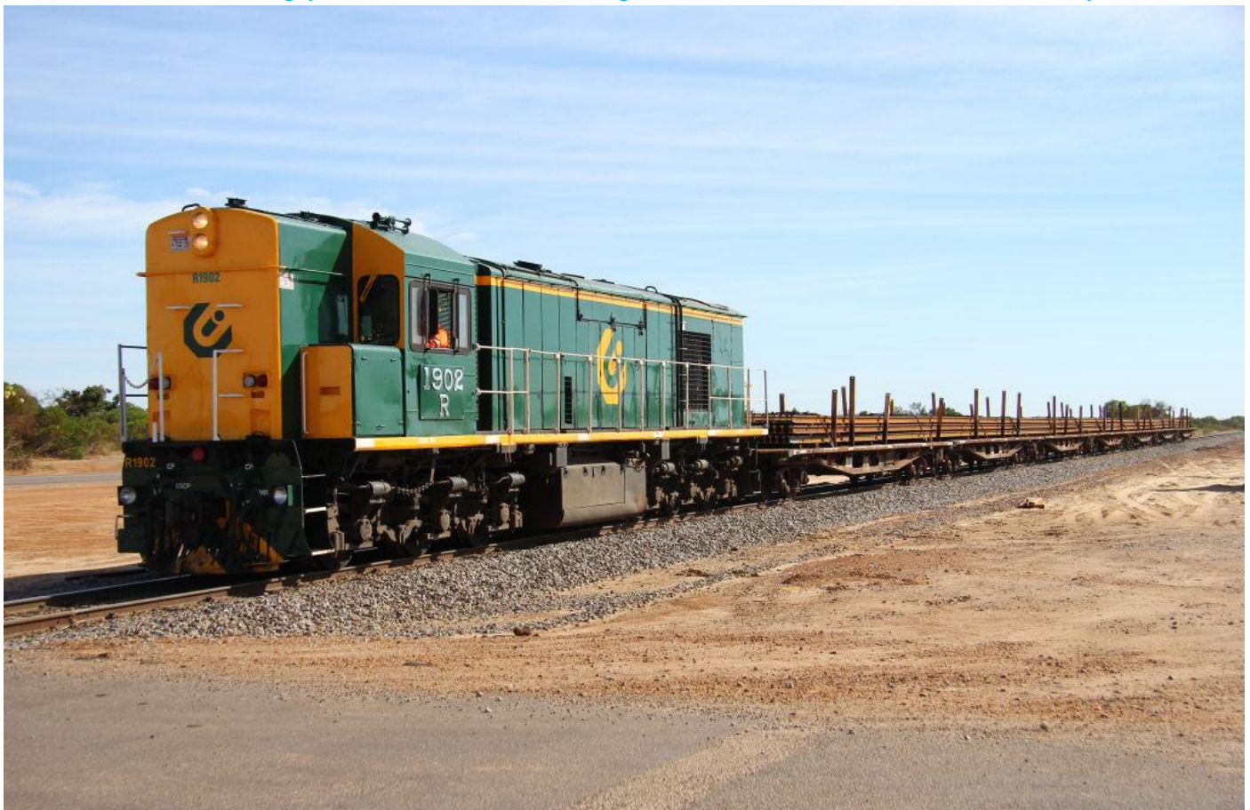
R1902 on rail train at Kojerena on Narngulu Mullewa line November 24th.