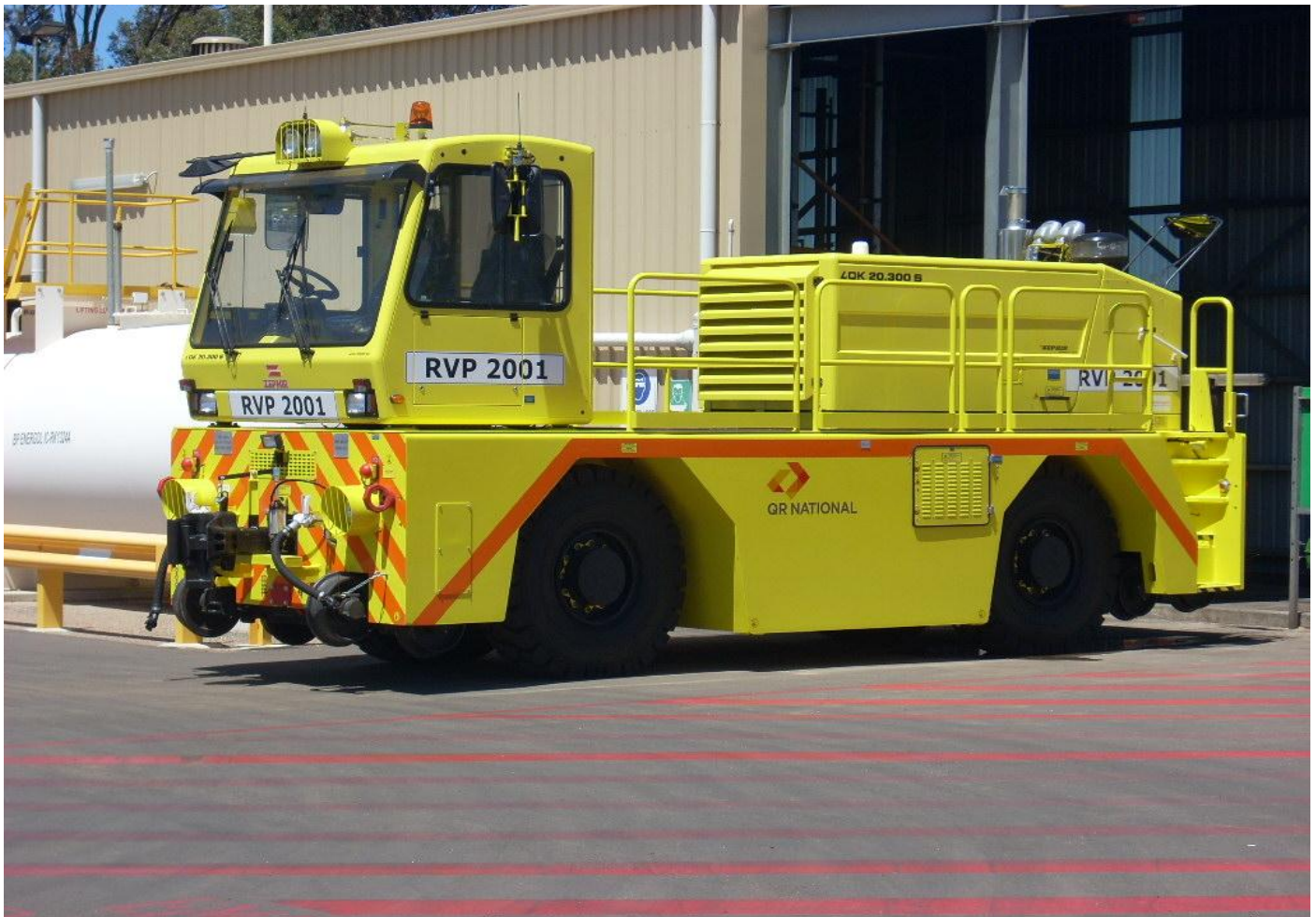
RVP2001 new hi-rail empty ore car shunt tractor at Esperance Port December 2nd.