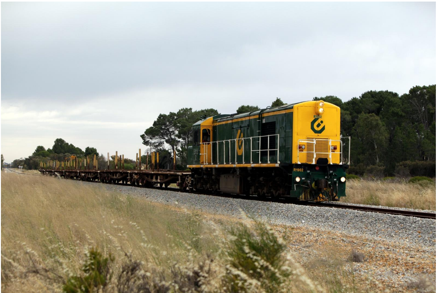
R1902 on 4RT2 empty rail train at Coomberdale December 1st.