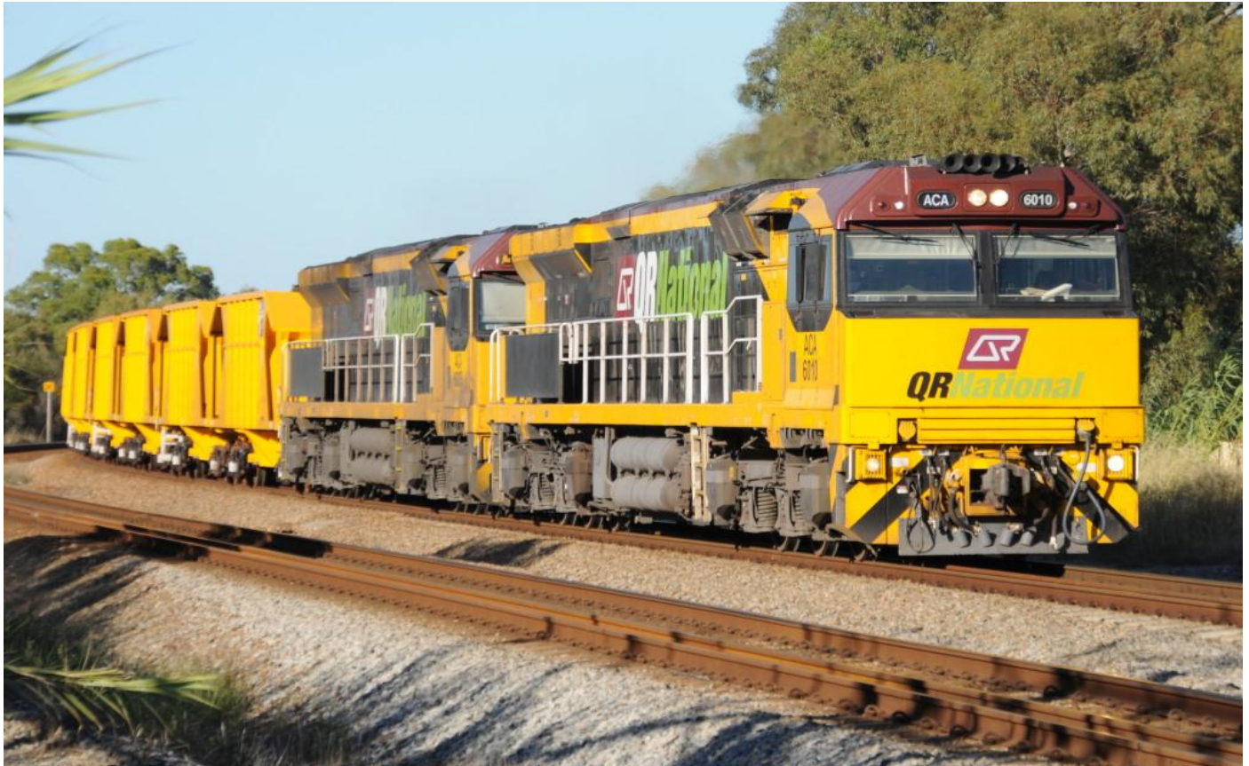
ACA6010 & ACA6005 on 7035 empty ore train at Bellevue November 12th.