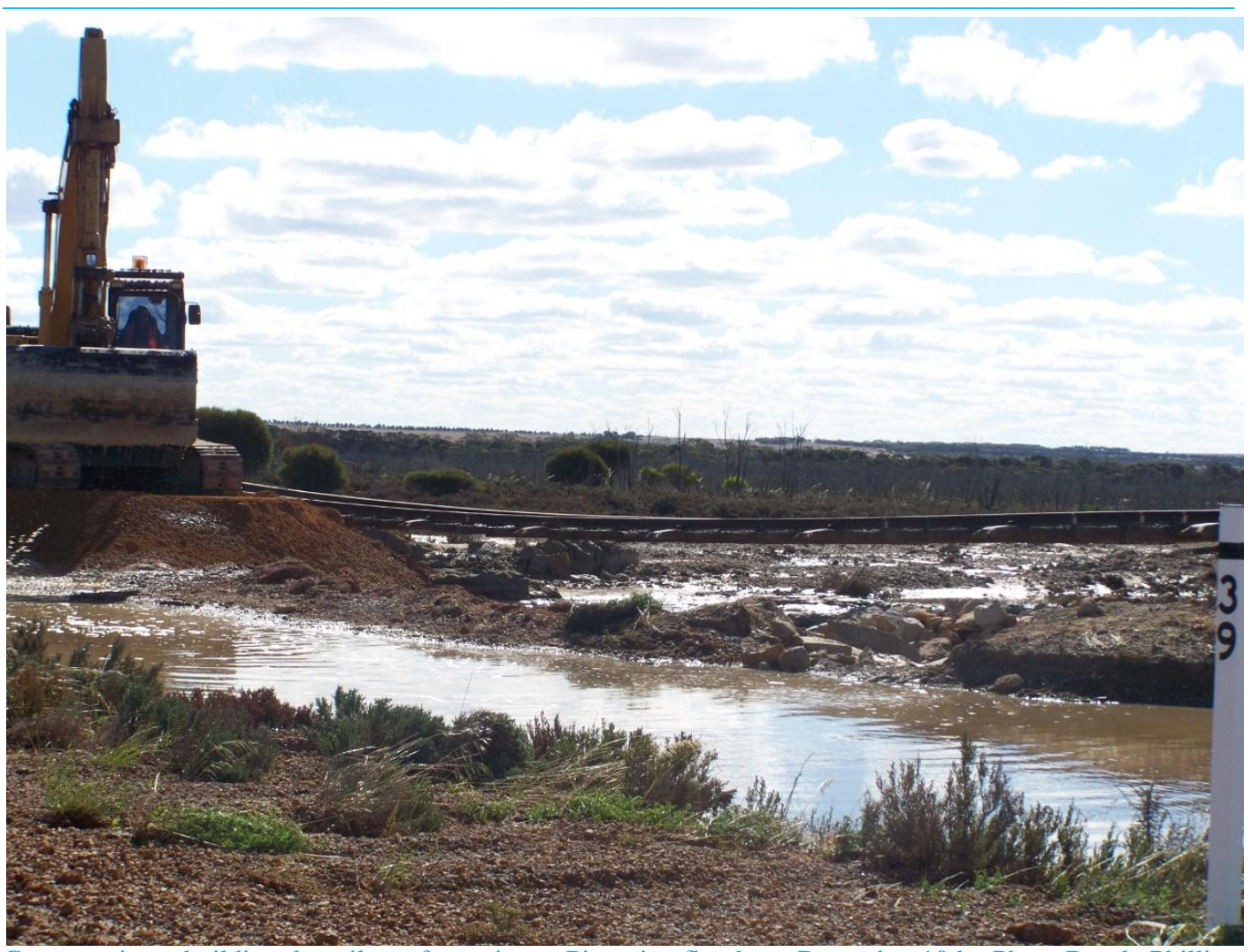
Commencing rebuilding the railway formation at Pingaring floodway December 10th.

Extensive flooding took place on Lake Grace Hyden line from 3km south of Pingaring to Karlgarin resulting in services being suspended till water recedes and repairs undertaken. John Holland track crew undertook the track rebuilding with AD Contracting from Albany providing crews and heavy machinery to rebuild the formation that also saw ADH transport hauling in ballast by road. This heavy rain fell on December 6th with Pingaring receiving 150mm and Hyden 105mm that has seriously disrupted harvesting and will probably cause the crops to be downgraded. Flood waters flowed northwest from upper reaches of river system in Hyden area to Narembeen causing some local flooding. Flood water from Pingaring area flowed west and washed over section of old Kondinin Kulin line that had been previously flooded in the 1990s.