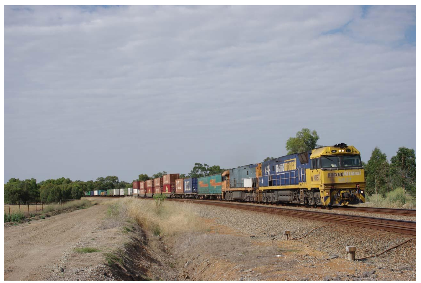
NR37 & NR70 on 1PS6 at Millendon on November 27th.