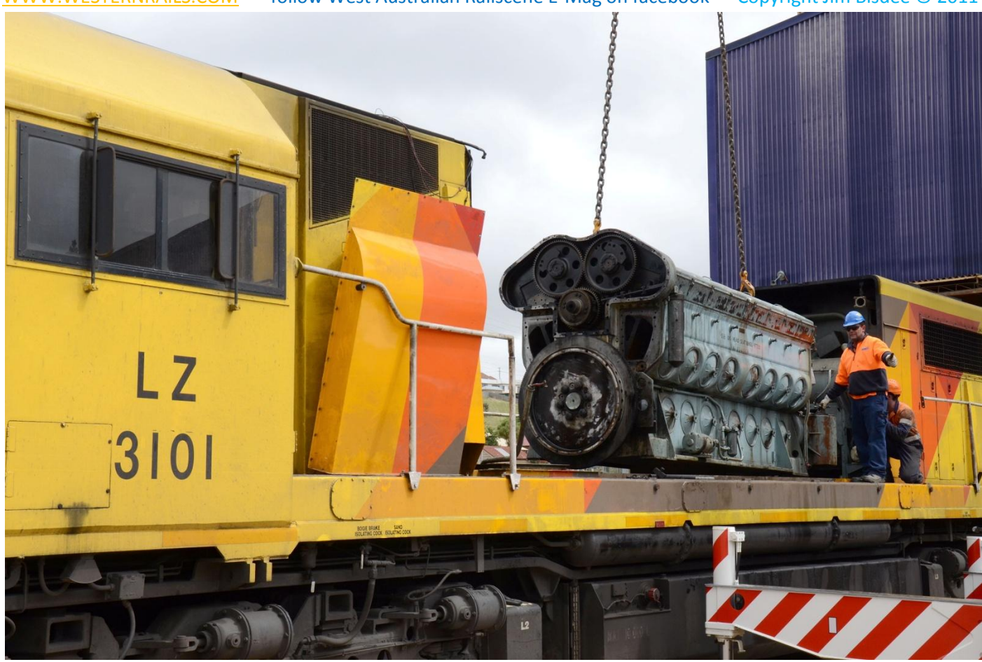
LZ3101 having failed and stripped down EMD 645E3 engine removed December 6th at CFCLA workshop Goulbourn NSW to enable fitting of a replacement.

West Australian Railscene e-Mag is published weekly by Jim Bisdee on rail happenings on West Australian Railroads WWW.WESTERNRAILS.COM follow West Australian Railscene E-Mag on facebook Copyright Jim Bisdee © 2011