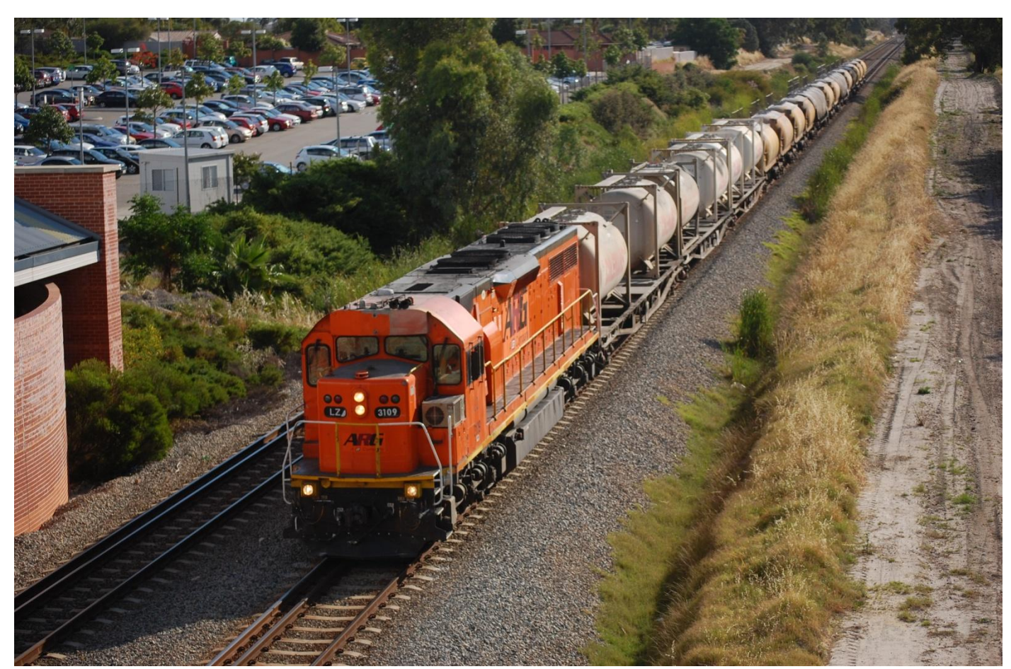
LZ3109 on 5197 Soundcem cement and lime shunter at Thornlie on December 5th.