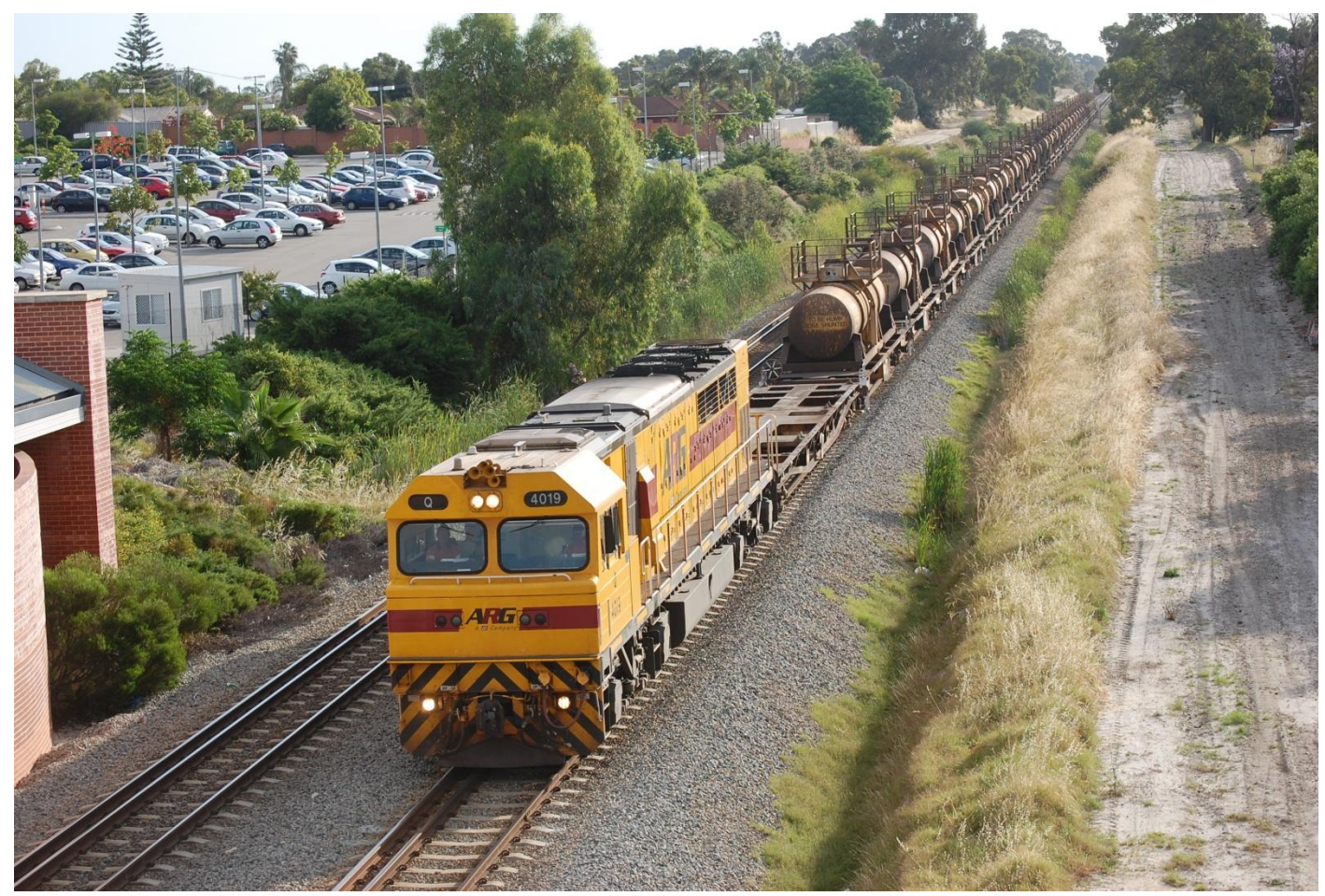
Q4019 on 2167 empty acid tankers at Thornlie on December 5th.