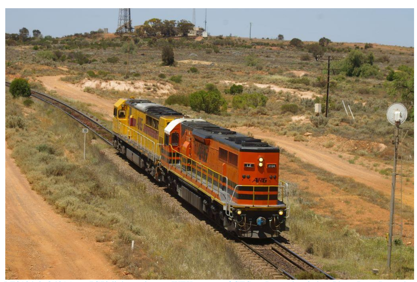
LZ3104 & Q4015 run 7C72 light engines to WEK at start of CTC on December 3rd.