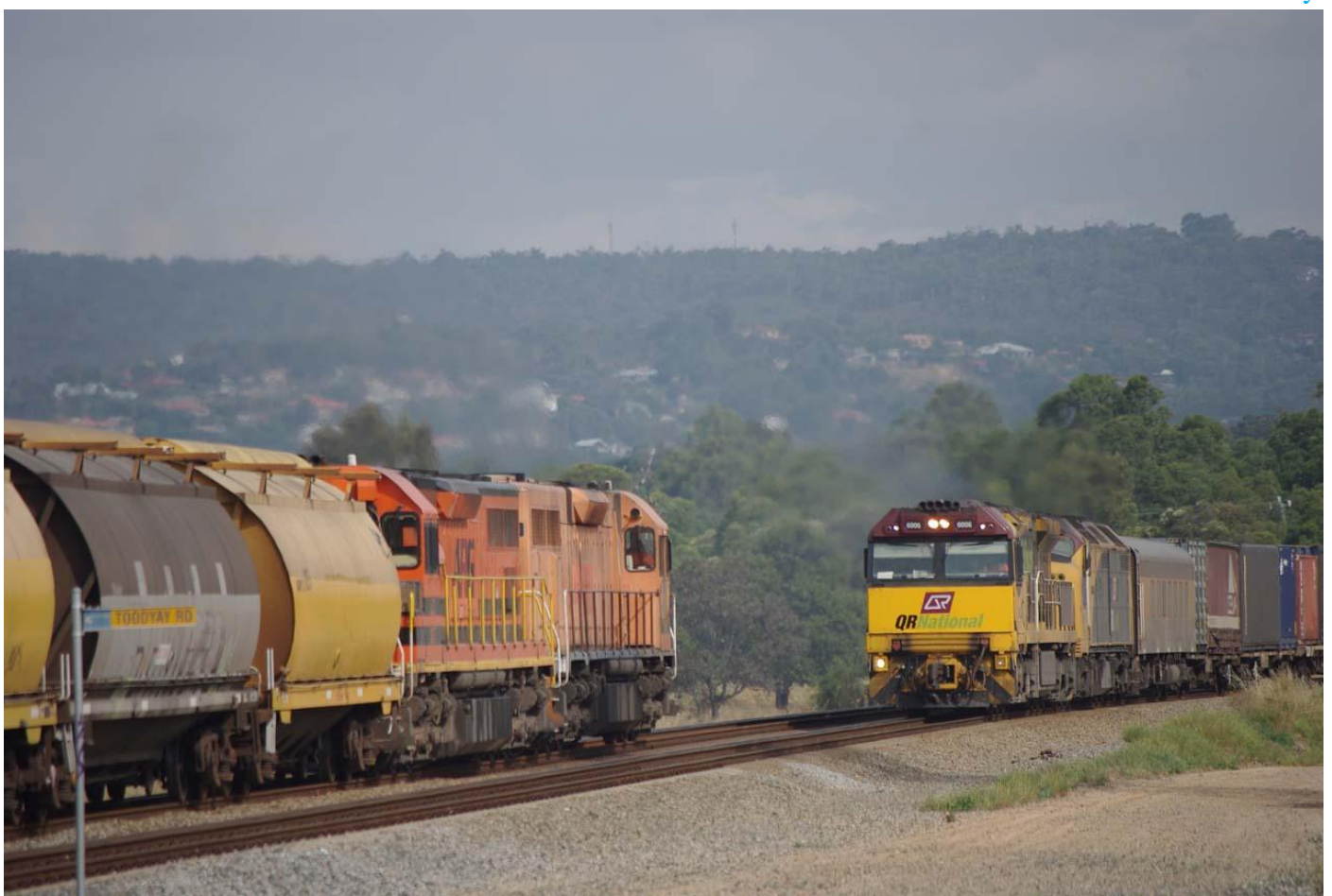
L3113 & LZ3117 on 7056 grain crosses 6006 & CLP11 on 7PM1 QRN intermodal just south of Toodyay Road crossing at Stratton on November 26th.