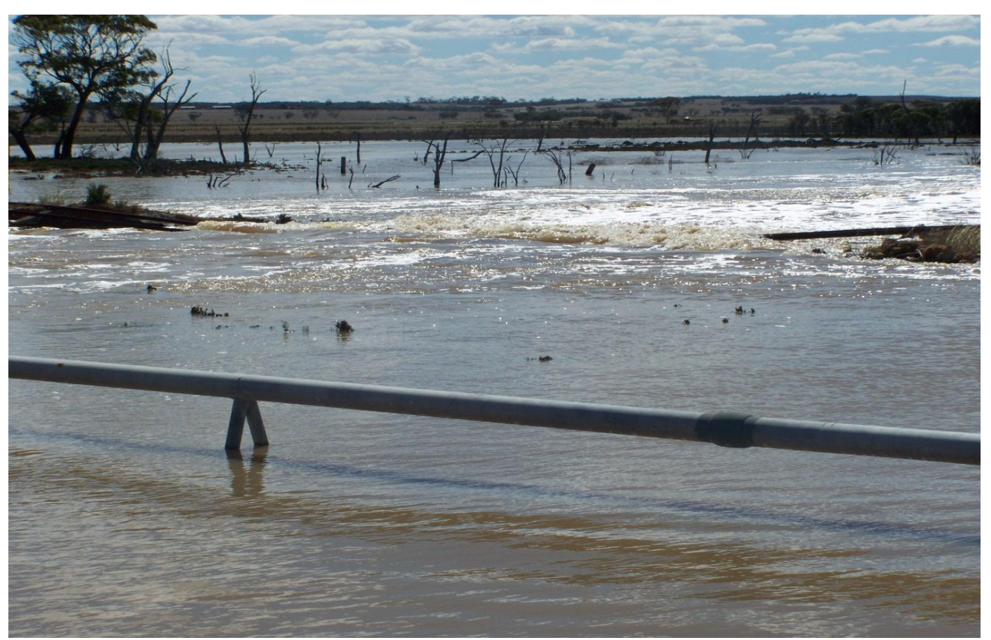
Out of use Kondinin Kulin line showing recent washaway on December 10th.