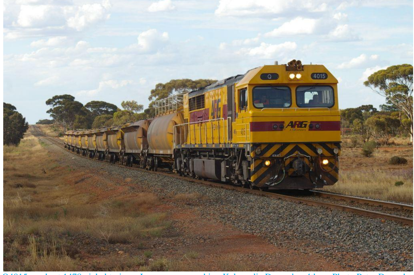
Q4015 on short 1478 nickel train ex Leonora approaching Kalgoorlie December 4th.