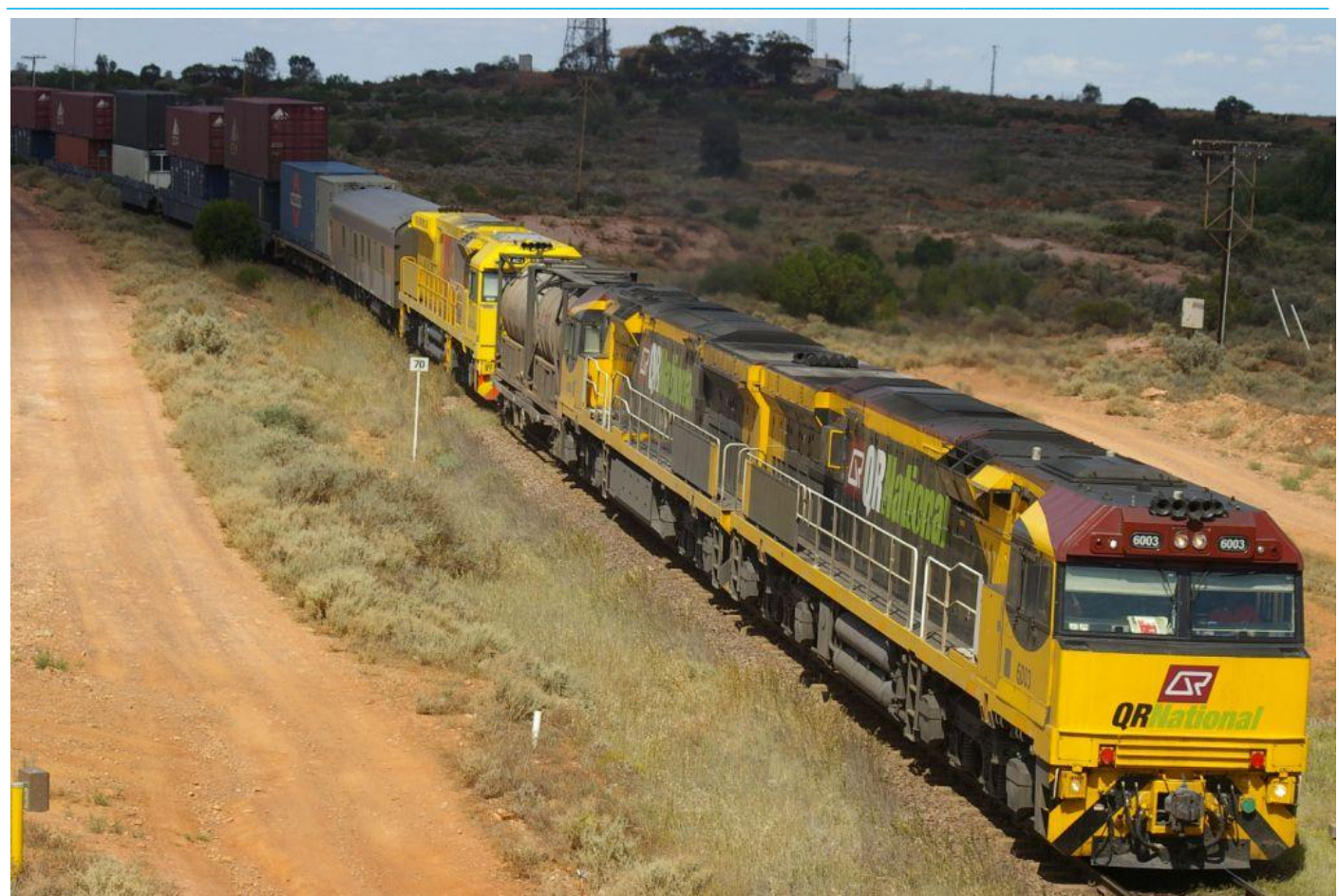
6003 & 6004 on 5MP1 QRN intermodal hauling new C44ACi locomotive ACB4405 on its delivery run to QR National Forrestfield entering Kalgoorlie on December 3rd.

ACB4401 and ACB4402 were hauled out of Forrestfield on 6025 overnight freight to Kalgoorlie on December 9th behind the usual combination of multi unit Q class Q4019 & Q4018 to enter service.