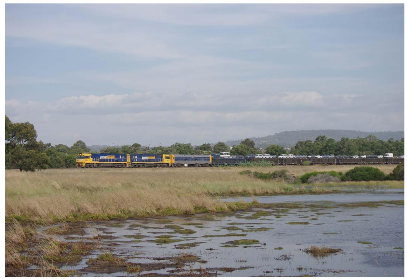
NR22 & NR23 on 7PM5 runs past the Stratton wetlands on November 26th.