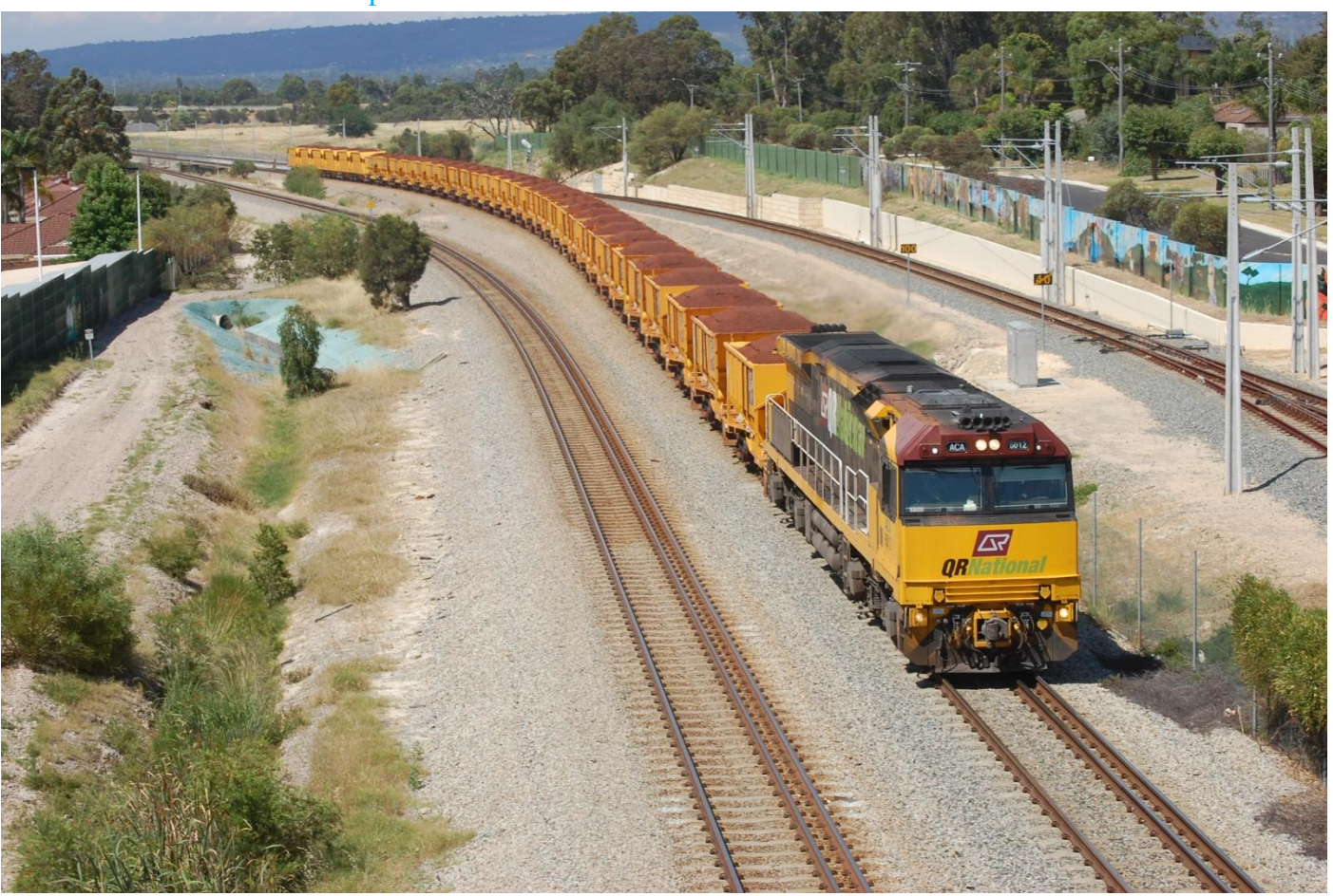
ACA6012 on 2034 ore train at Thornlie on December 5th.