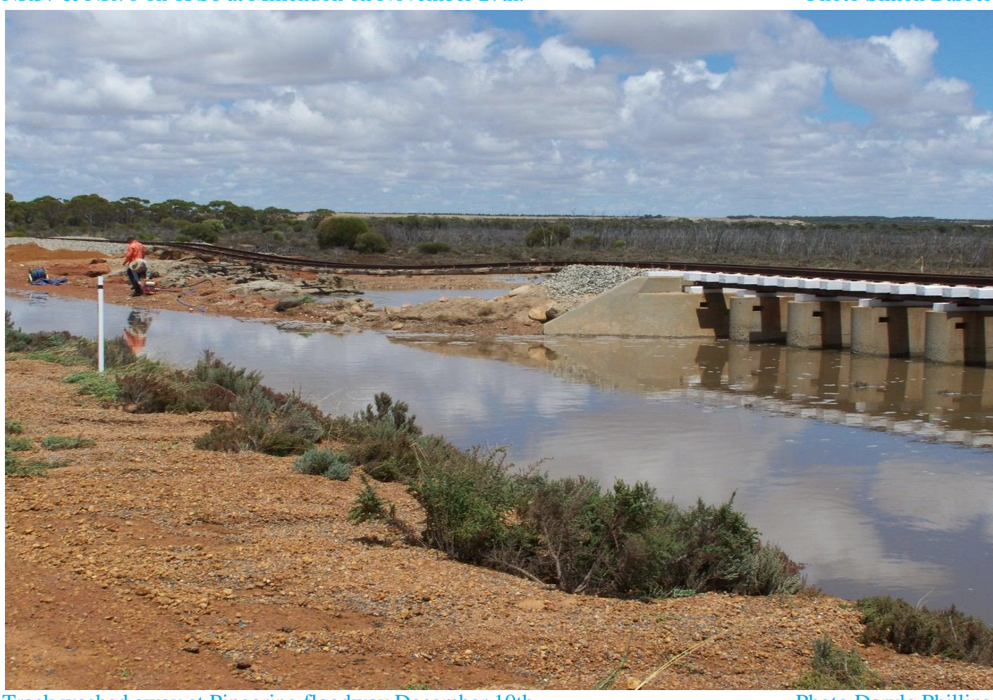
Track washed away at Pingaring floodway December 10th.