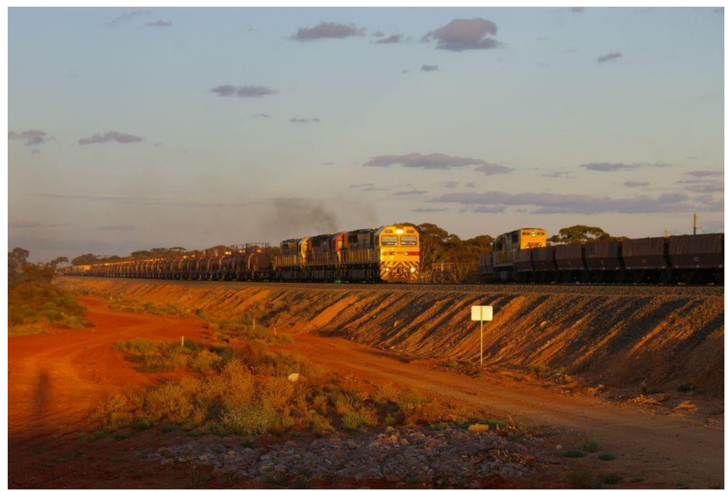
Q4019, Q4005 & Q1012 run 7426 freight past Q4011 DPU on 7414 empty ore at Binduli December 11th.