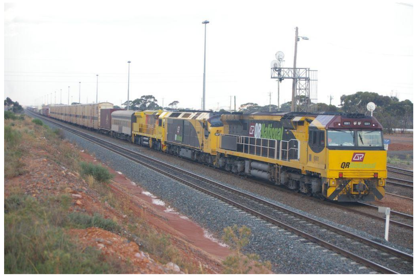
6001, CLP11 dead attached final ACB of the current order ACB4406 on 2MP1 QRN intermodal departing West Kalgoorlie yard on December 7th.