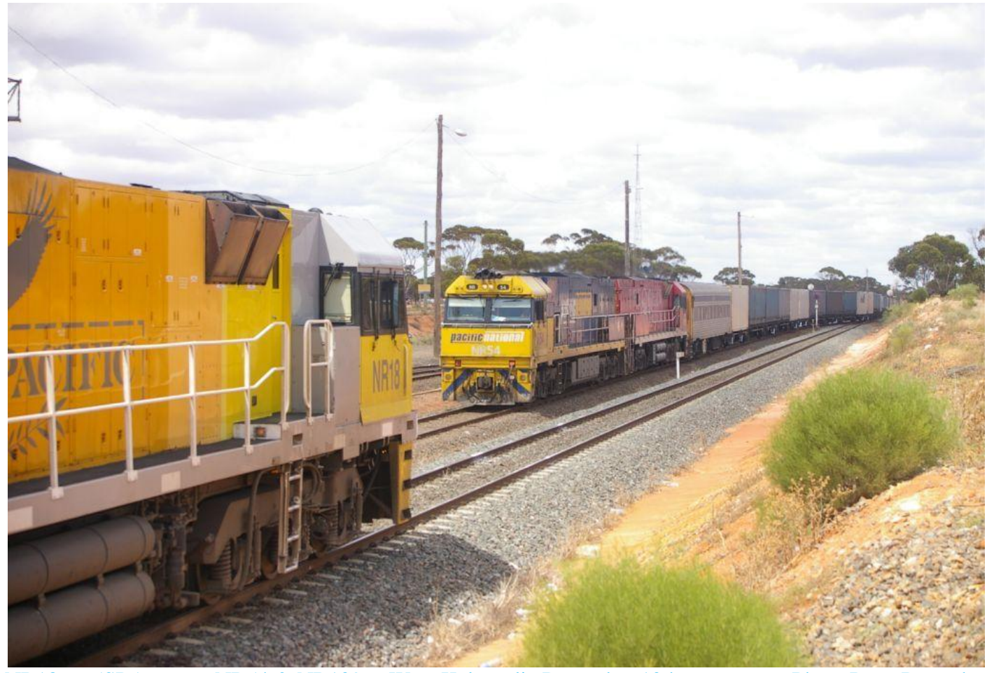
NR18 on 5SP5 crosses NR54 & NR109 at West Kalgoorlie December 10th.