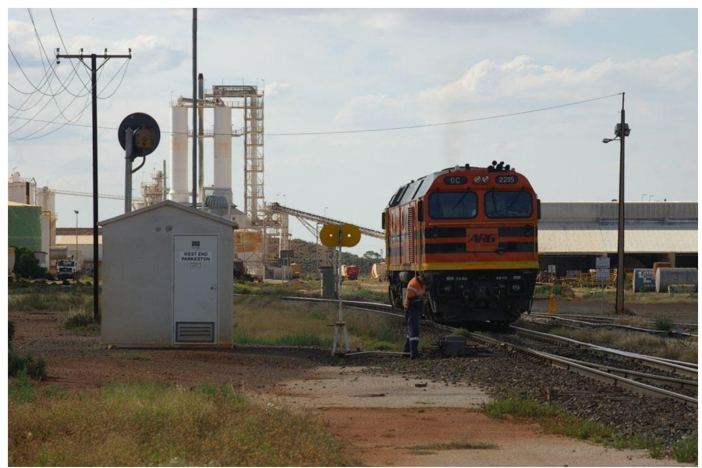
Setting the road to enable DC2215 to enter loop at Parkeston December 10th.