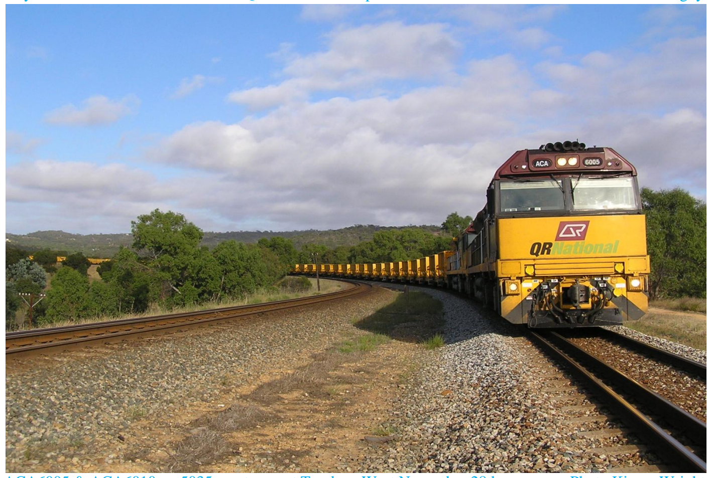
ACA6005 & ACA6010 on 5035 empty ore at Toodyay West November 28th.