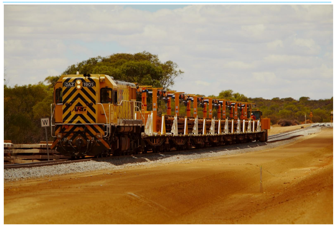
DAZ1901works the loaded rail train discharging rail to be used on the future Leda loop on Perenjori the line December 16th this will be the third new loop on this line when commissioned.

Mt Lawley Station on the Midland line is the first station to under go an improvement programme to enhance their functionality particularly for any person with disabilities. These improvements began on December 3rd with station being closed till December 22nd the station will again be temporally from January 14th and 30th to enable these works to be undertaken. Mt Lawley Station will have the whole platform resurfaced, a new larger and improved shelter, improved lighting, handrails and signage for disabled passengers. Thee gap between the EMU railcars and the platform will be minimised to enhance safety. The car park will remain open, as will the bridge linking Railway Parade and Whatley Crescent. A coaster bus will convey passengers to Maylands Station to board services for the durations of the works.