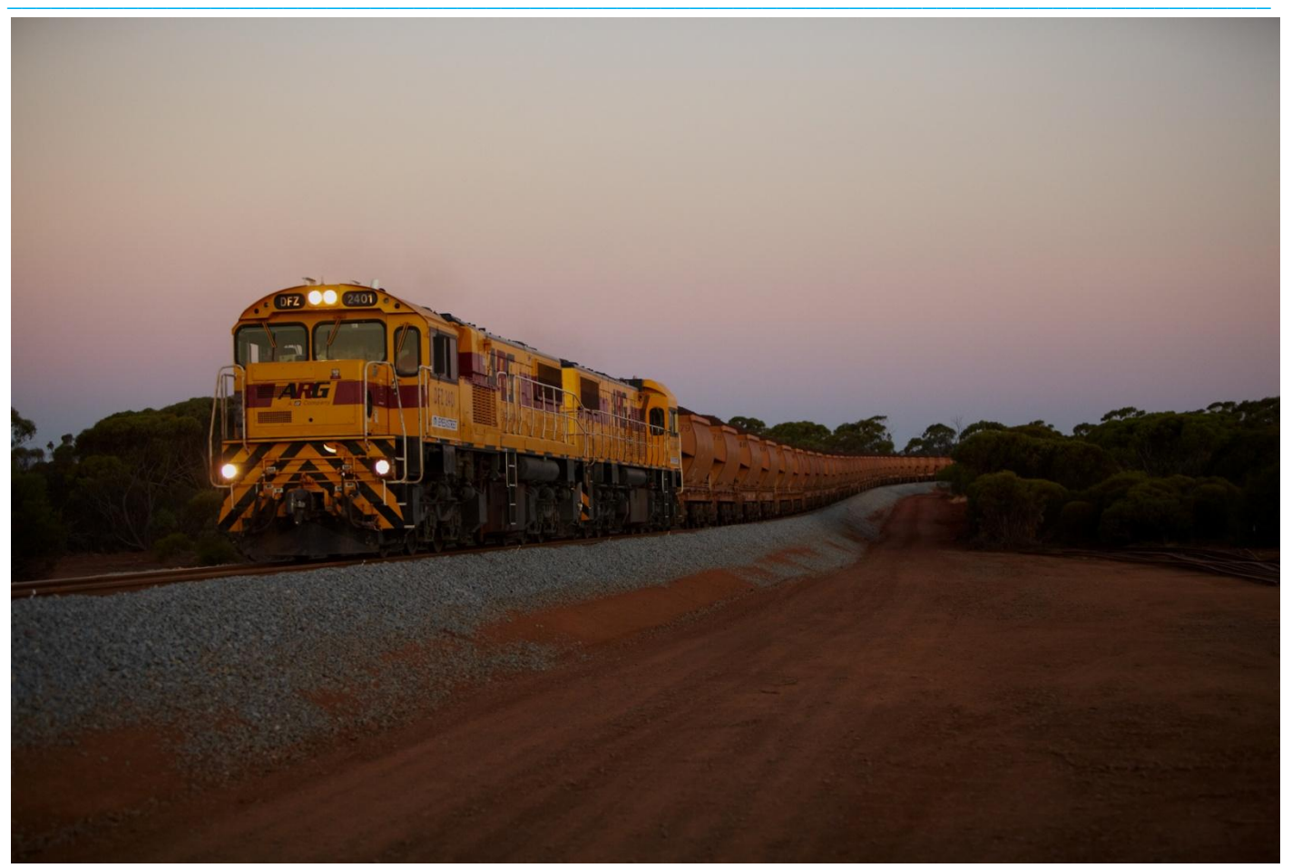
DFZ2401 & DFZ2404 on 6723 ore train approaching Canna at dusk December 16th.

A DPU trial was conducted with 2416 empty ore on December 5th to Koolyanobbing and return. Following the trial limited DPU operations of about one train per day resumed for the remainder of the week then near full DPU resumption took place week commencing 11th December.