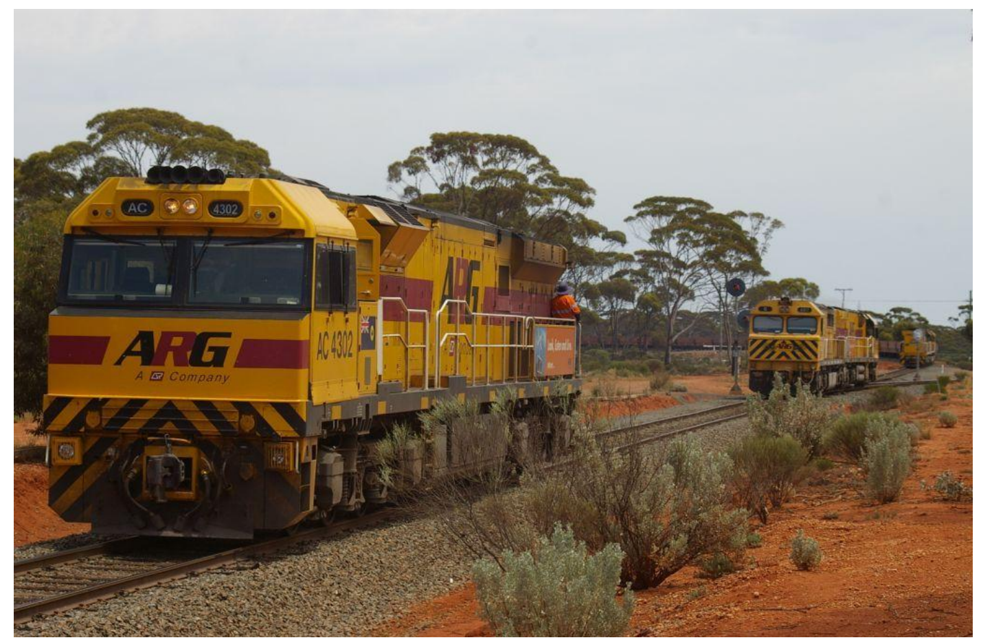
AC4302 waits while AC4308 hauls detached Q4017 to West Kalgoorlie then AC4302 will run back onto a very late 7419 ore with ACA6002 & Q4011 to run to Esperance December 10th.