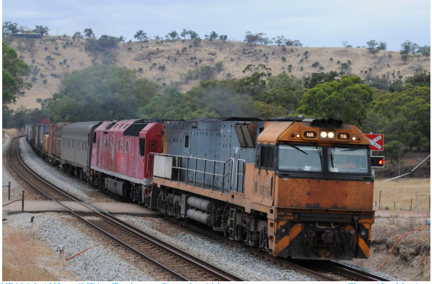
NR116 & AN3 on 6MP4 at Toodyay on December 11th.