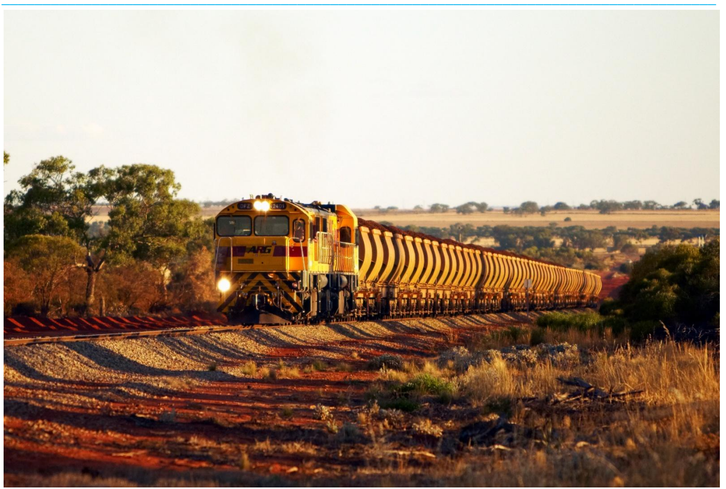
DFZ2401 & DFZ2404 run 6723 recently commenced Mt Gibson ore train Perenjori to Geraldton up a grade north of new Bell crossing loop on December 16th.

ACB4401 and ACB4402 were hauled dead attached on 7025 freight to West Kalgoorlie on December 10th arriving on morning of 11th where they were detached and stabled. These two locomotives were hauled dead attached behind L3108 on 1443 fuel train to Esperance on December 11th arriving at Esperance early morning on 13th to enter service on iron ore traffic. ACB4403 was hauled dead attached to West Kalgoorlie on 2025 freight behind AC4308, LZ3104 & Q4102 on December 12th arriving on morning of 13th. ACB4403 entered service hauling 4443 fuel train long end leading to Esperance on 14th hauling dead attached LZ. ACB4404 had its modifications completed at UGR Bassendean and was hauled to Forrestfield on December 14th by DC2213 on 4154 light engine movement.