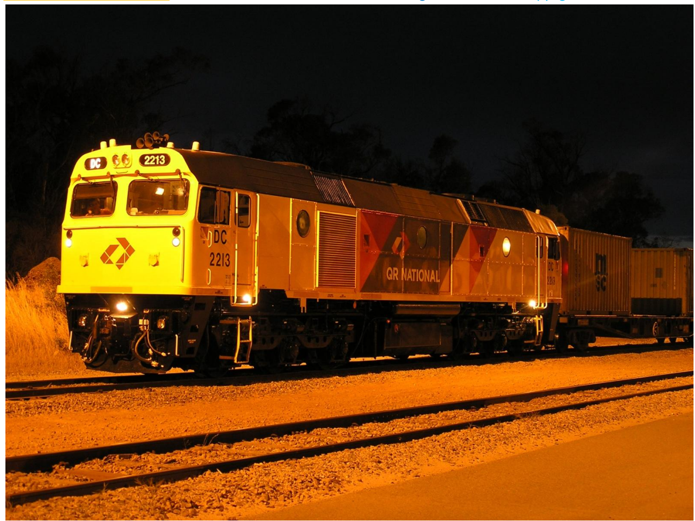
DC2213 on 2148 container train waiting to depart Kwinana Yards November 28th.

WWW.WESTERNRAILS.COM follow West Australian Railscene e-Mag on facebook