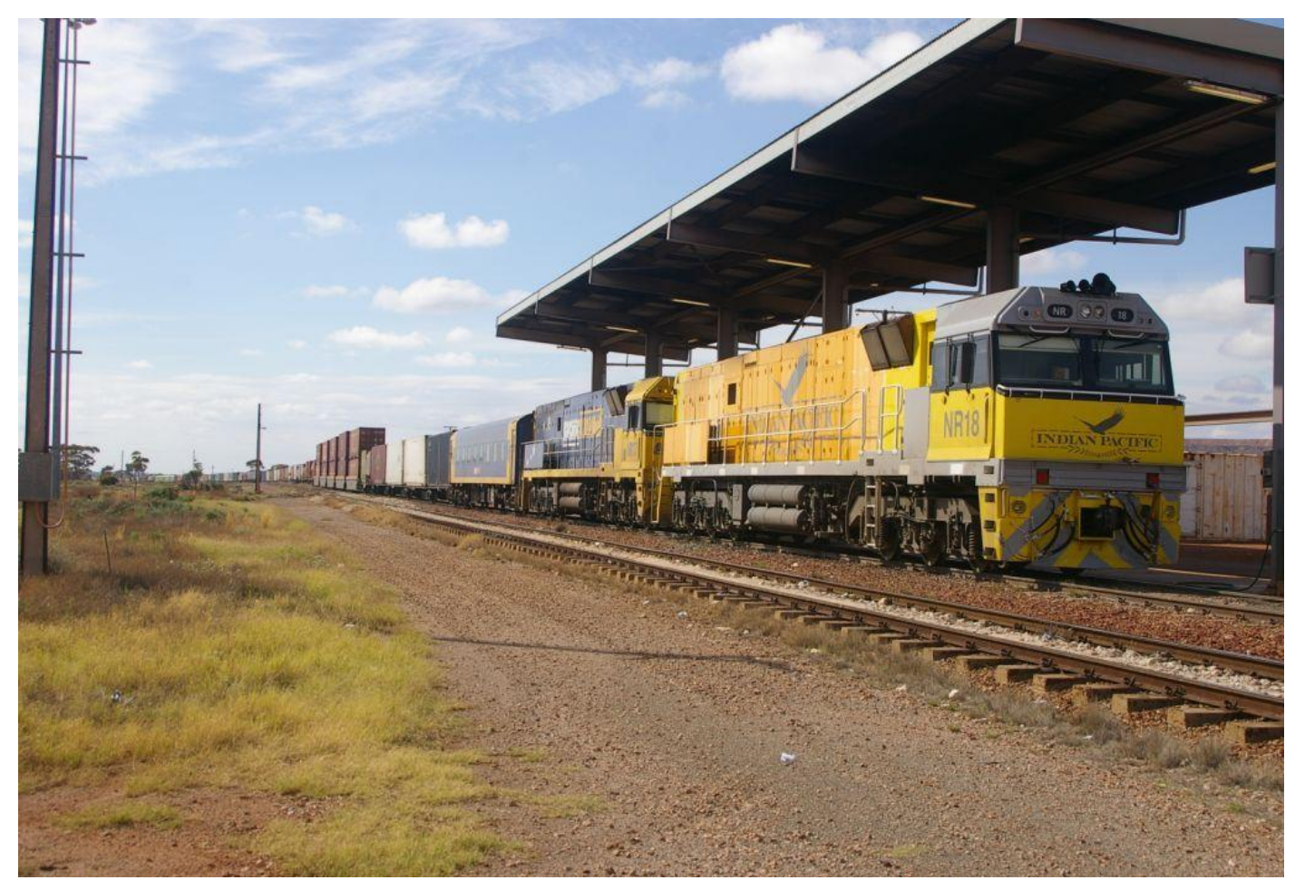
NR18 & NR17 both short end leading on 5SP5 at Parkeston on December 10th.