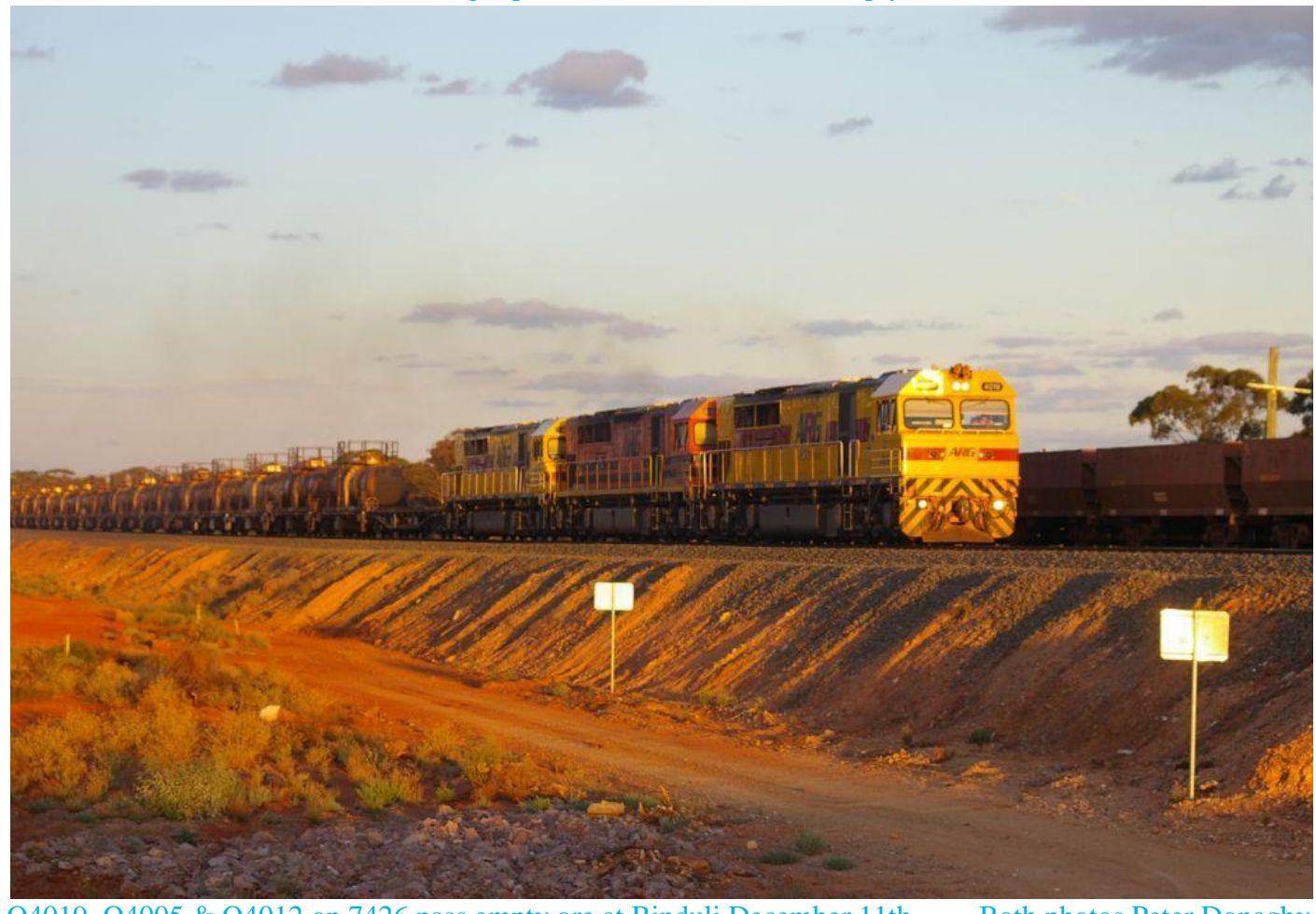
Q4019, Q4005 & Q4012 on 7426 pass empty ore at Binduli December 11th.