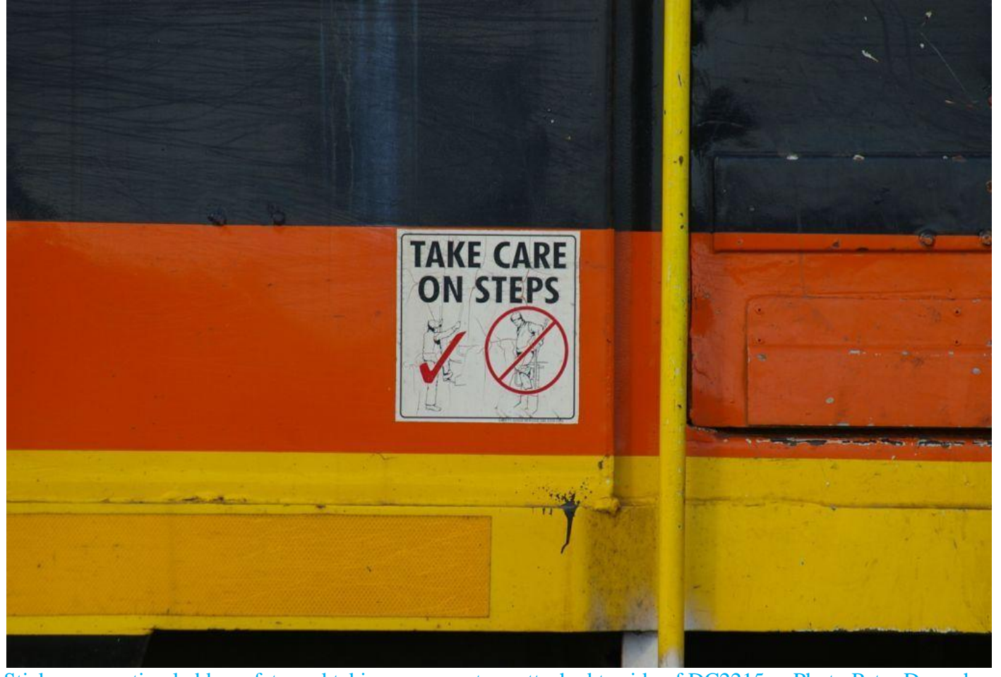
Sticker promoting ladder safety and taking care on steps attached to side of DC2215.