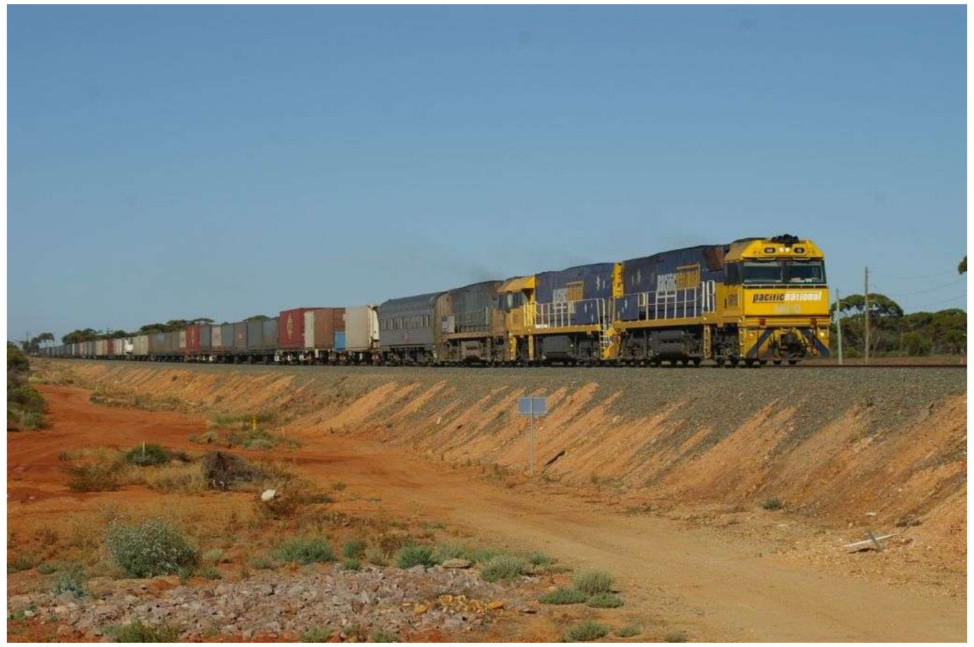
NR10, NR97 & NR11 on 6SP6 intermodal service at Binduli February 5th.