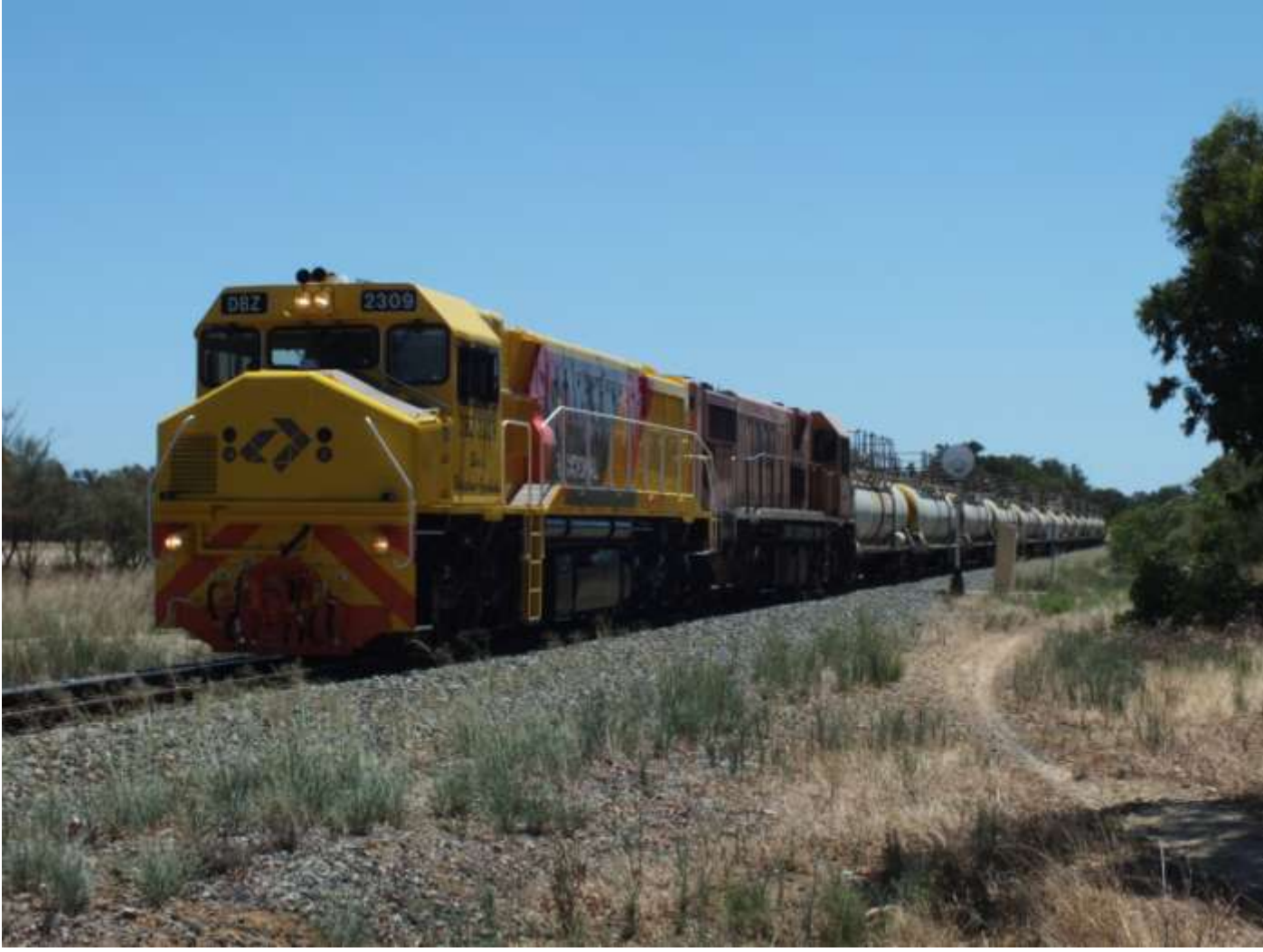
DBZ2309 on works trial & DB2311 on 4223 caustic tankers at Pinjarra East February 8th.