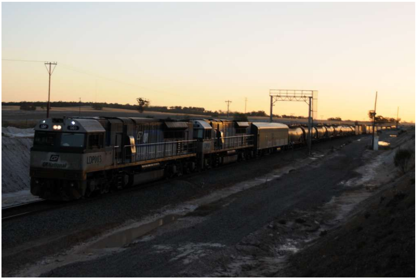
LDP003 & LDP001 runs 7PM1 intermodal with Cook tankers at Meenar February 4th.