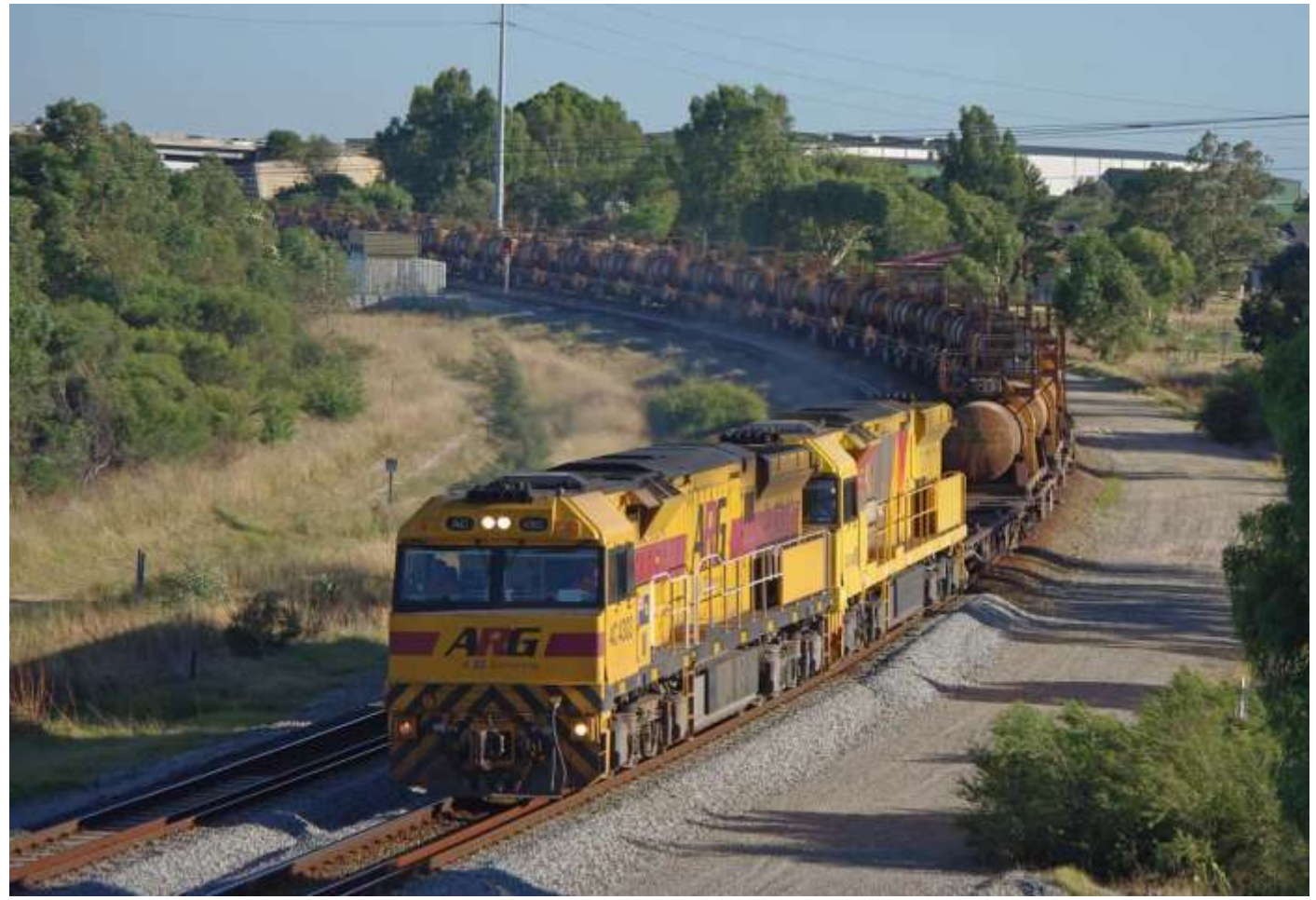
AC4303 & ACB4401 on 1426 freight to Kwinana at Welshpool February 6th.