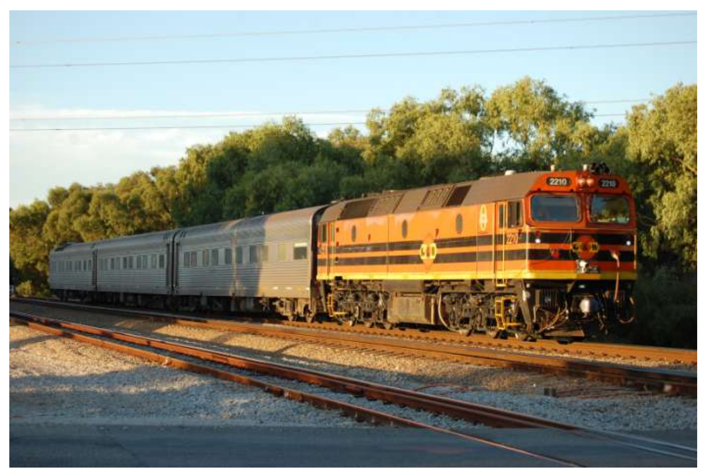
2210 on 3C12 AK track recording cars at Woodbridge February 7th.