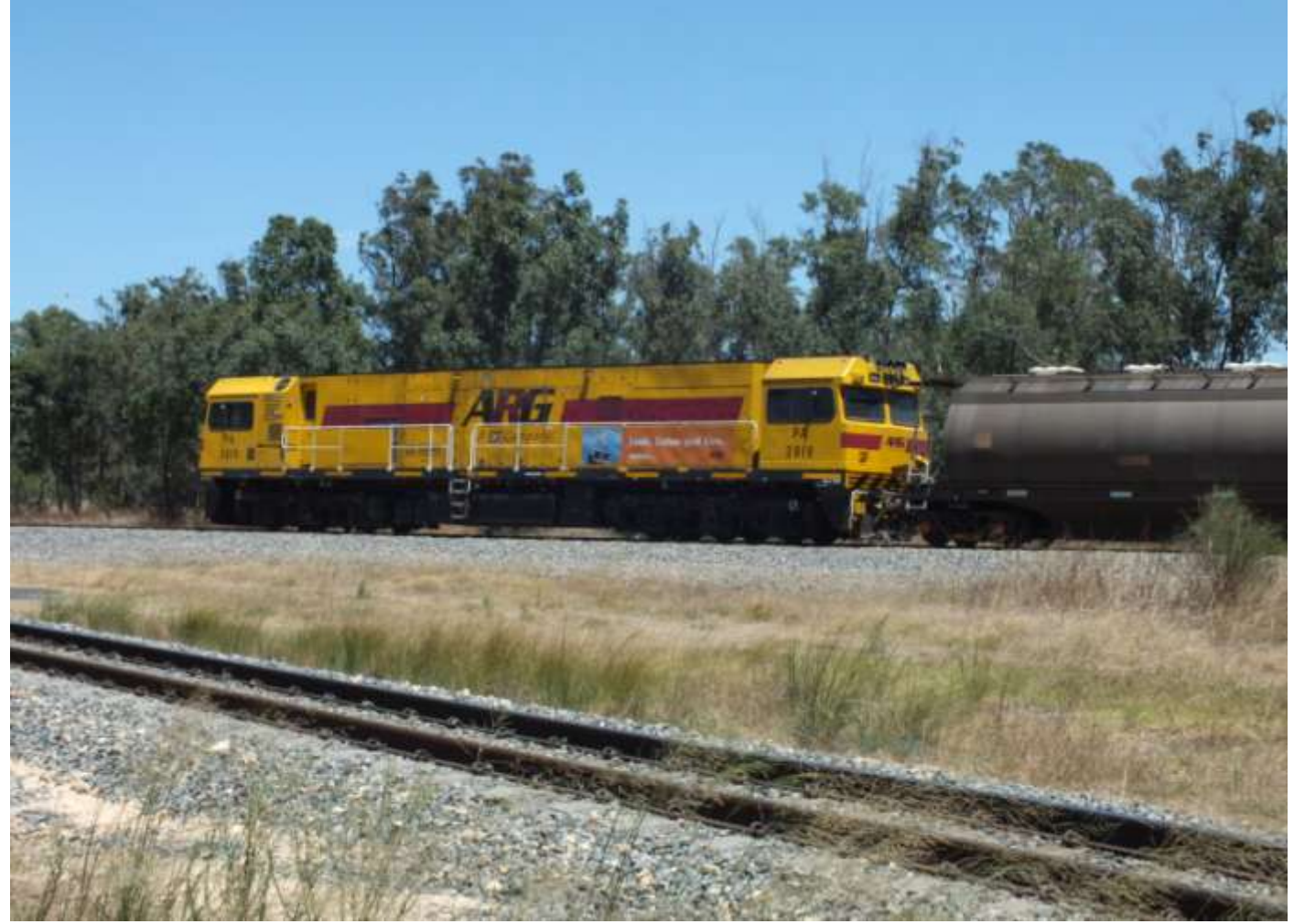
PA2819 on empty alumina train from Bunbury at Pinjarra East February 8th.