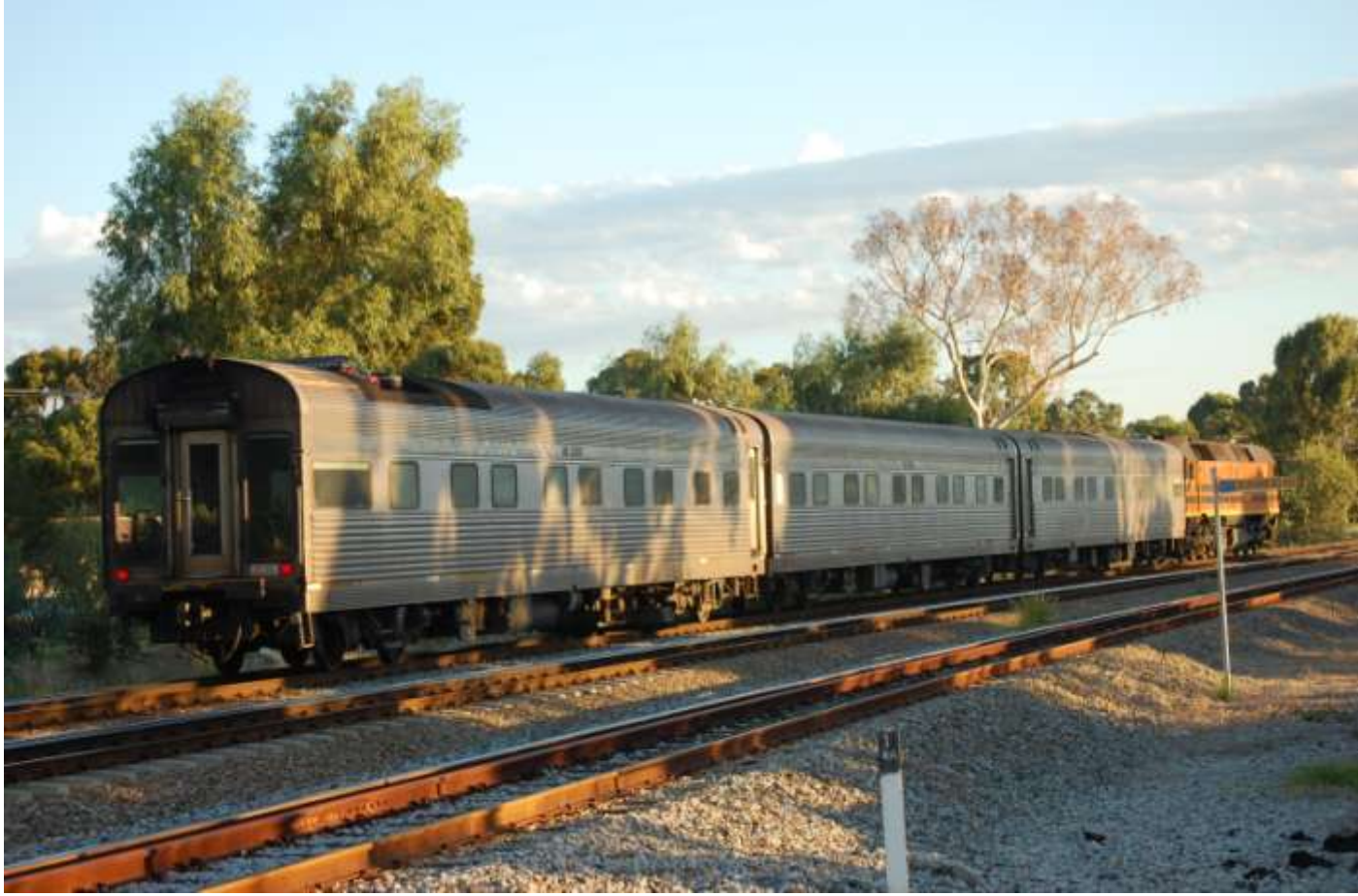
AK2283 on rear AK car inspection train at Woodbridge February 7th.