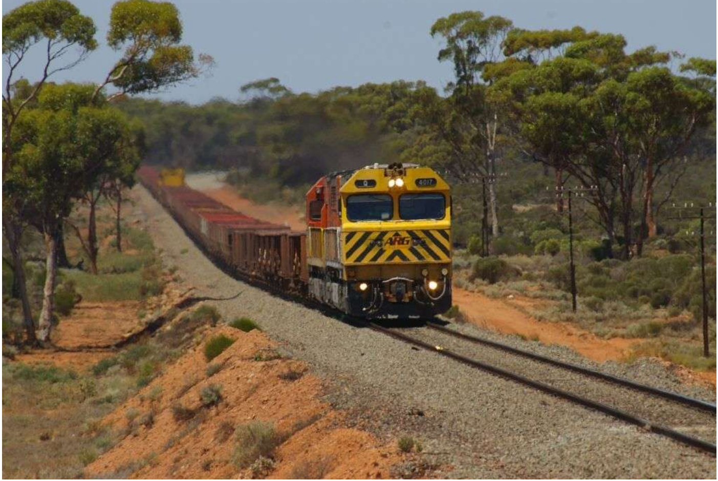
Q4017 & Q4003 with Q4011 mid train on 126 car empty DPU ore train north of Hampton February 5th.