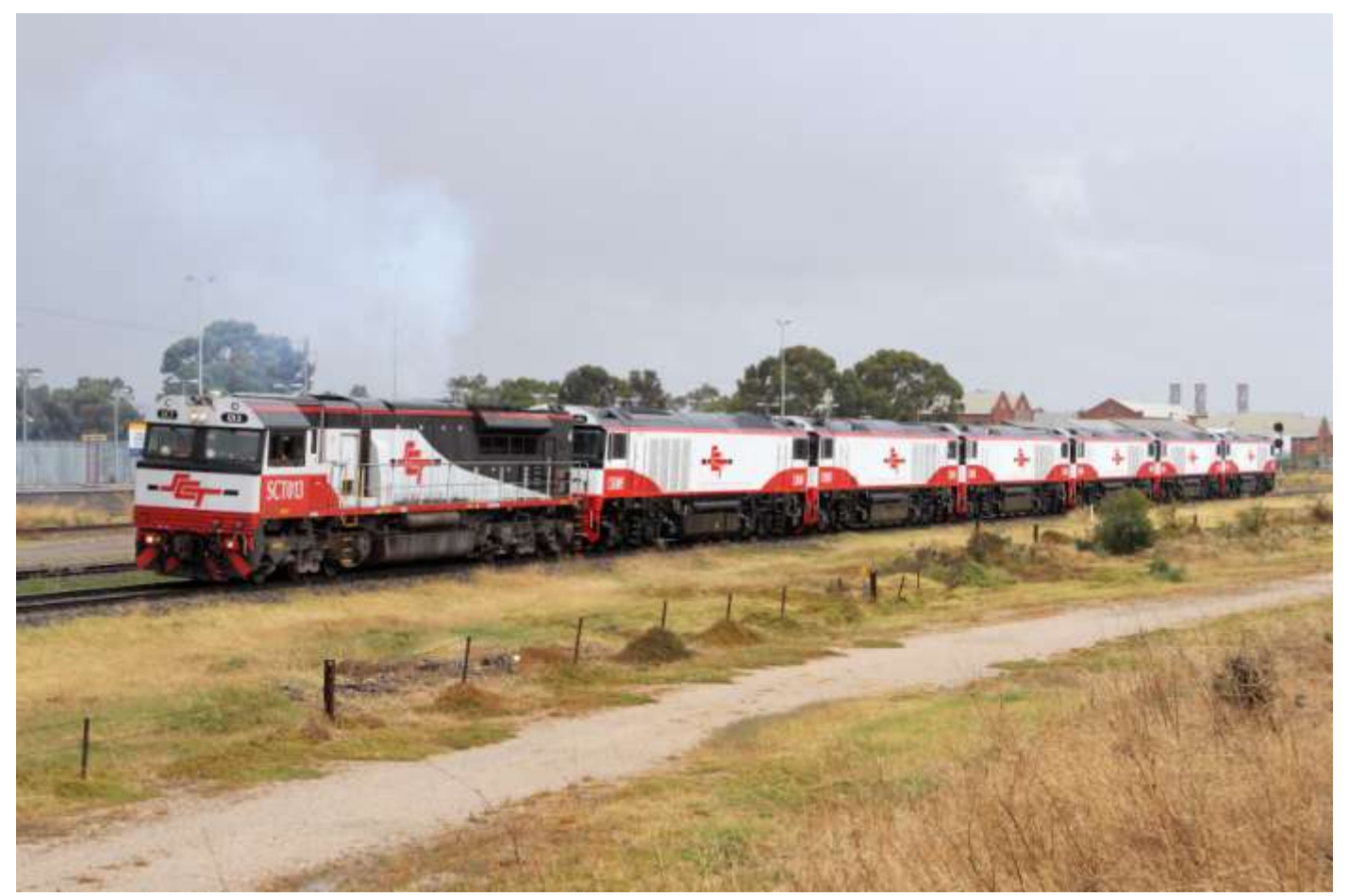
SCT013 hauls six new CSR locomotives to SCT yard for commissioning February 5th.