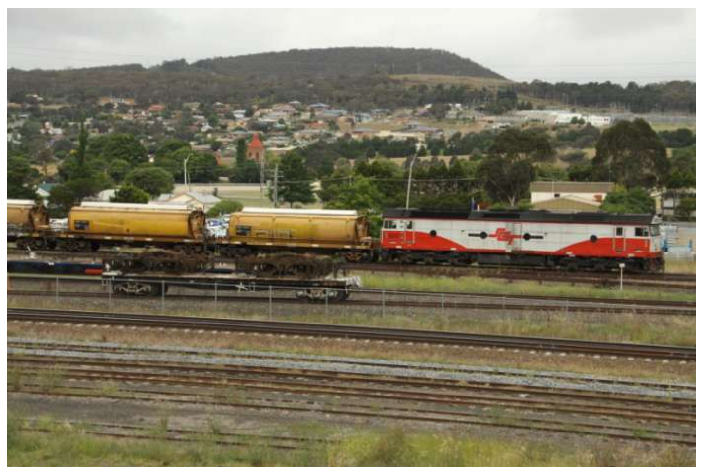
G512 on AGWF grain wagons at Goulburn February 1st after return from use on a Pacific National grain train out of Newcastle to North West NSW in late January.