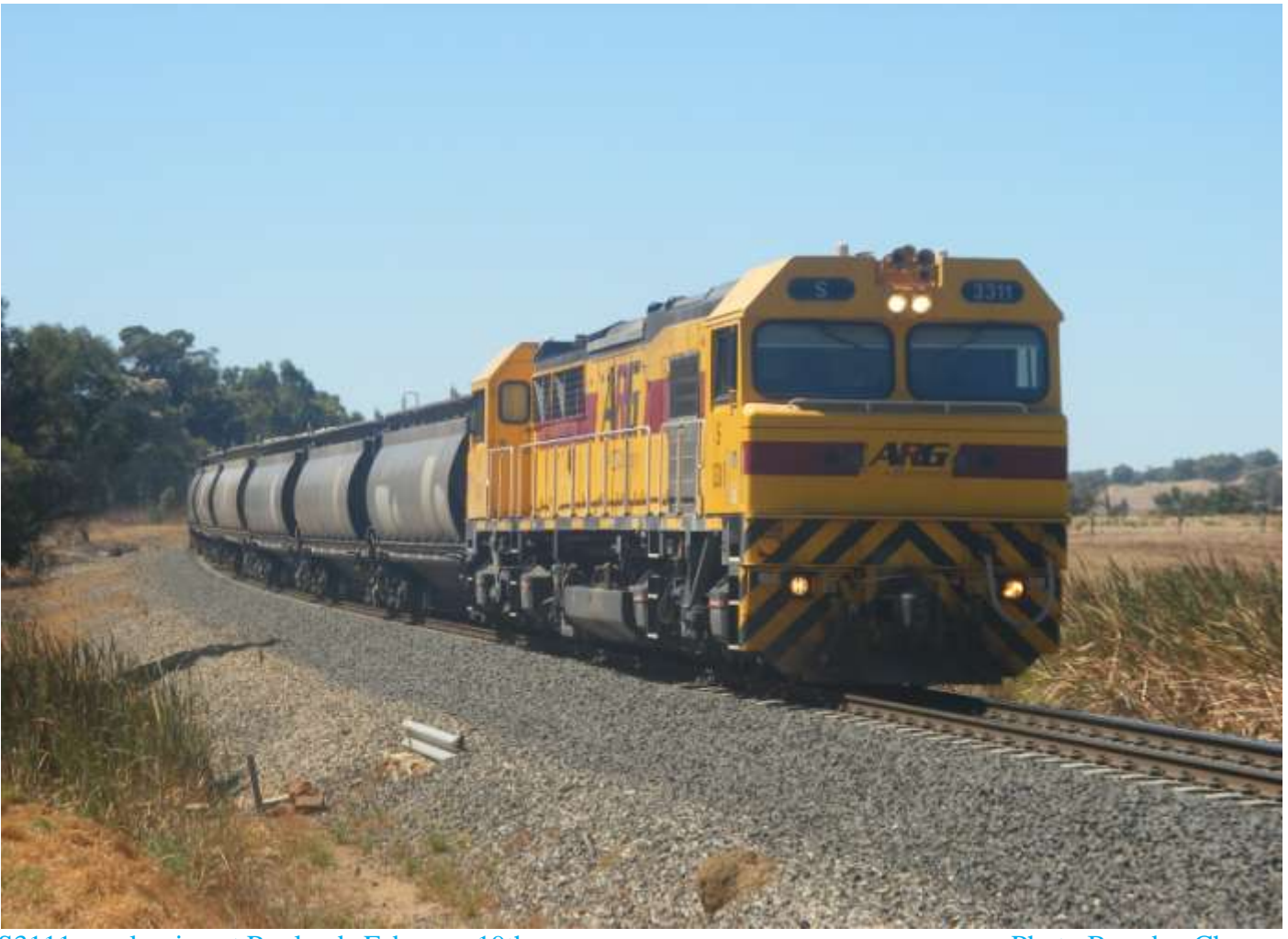
S3111 on alumina at Roelands February 19th.