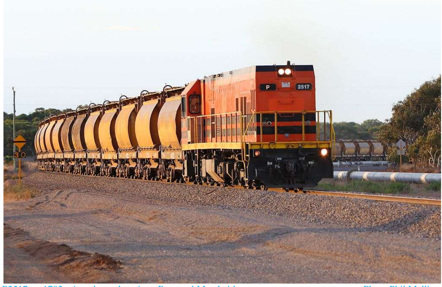
P2517 on 1702 minerals sands train at Bootenal March 4th.