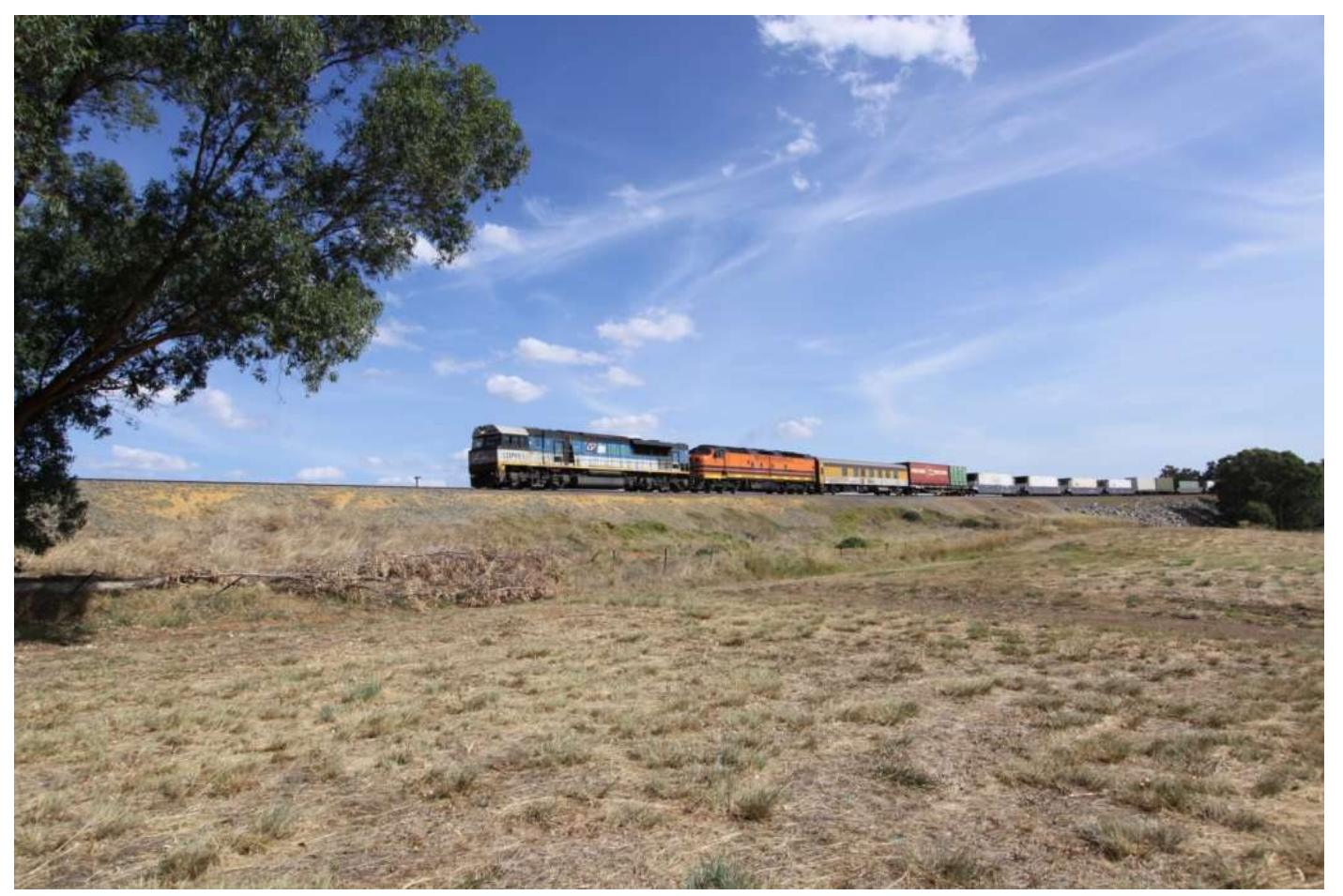
LDP003 & CLF2 on 7PM1 QRN intermodal at Brigadoon February 18th.