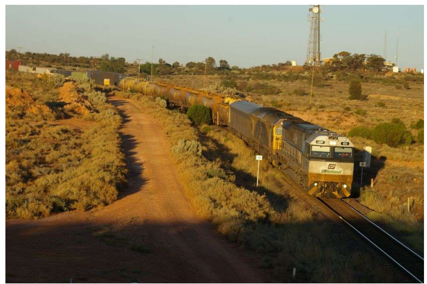
LDP003 & G516 on 3MP1 intermodal with Cook tankers at Kalgoorlie March 8th.