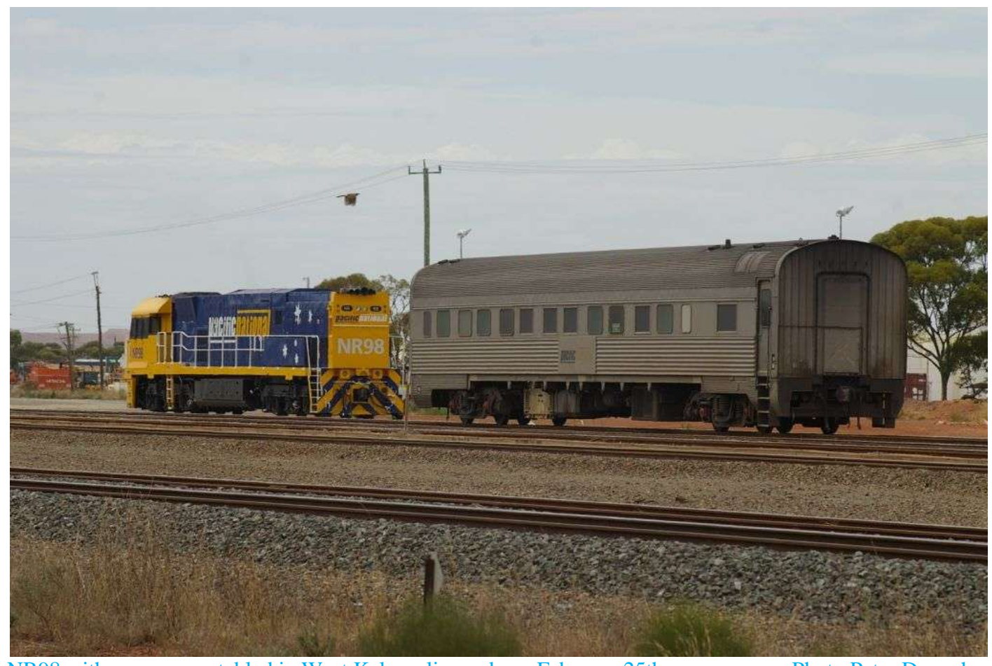
NR98 with a crew car stabled in West Kalgoorlie yards on February 25th.