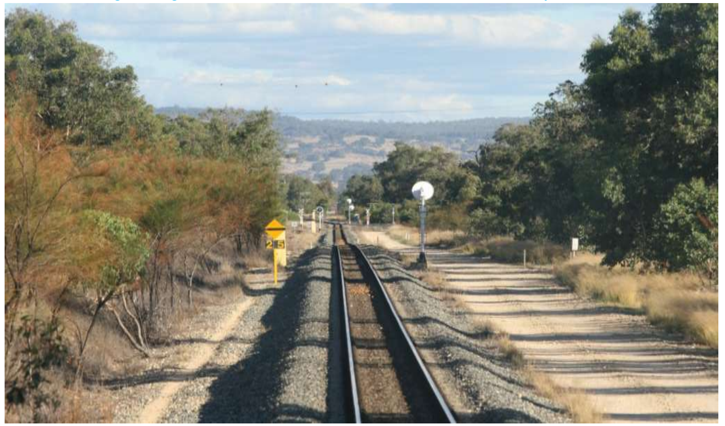
Drivers eye view of Pinjarra Calcine line with junction of Bunbury Calcine line and Dwellingup line in the distance February 9th.