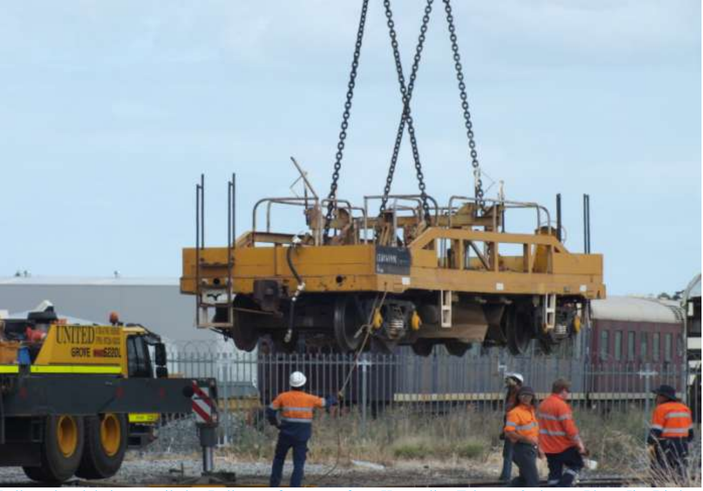
Ballast plough being re-railed at Bellevue after return from Karara line February 26th.