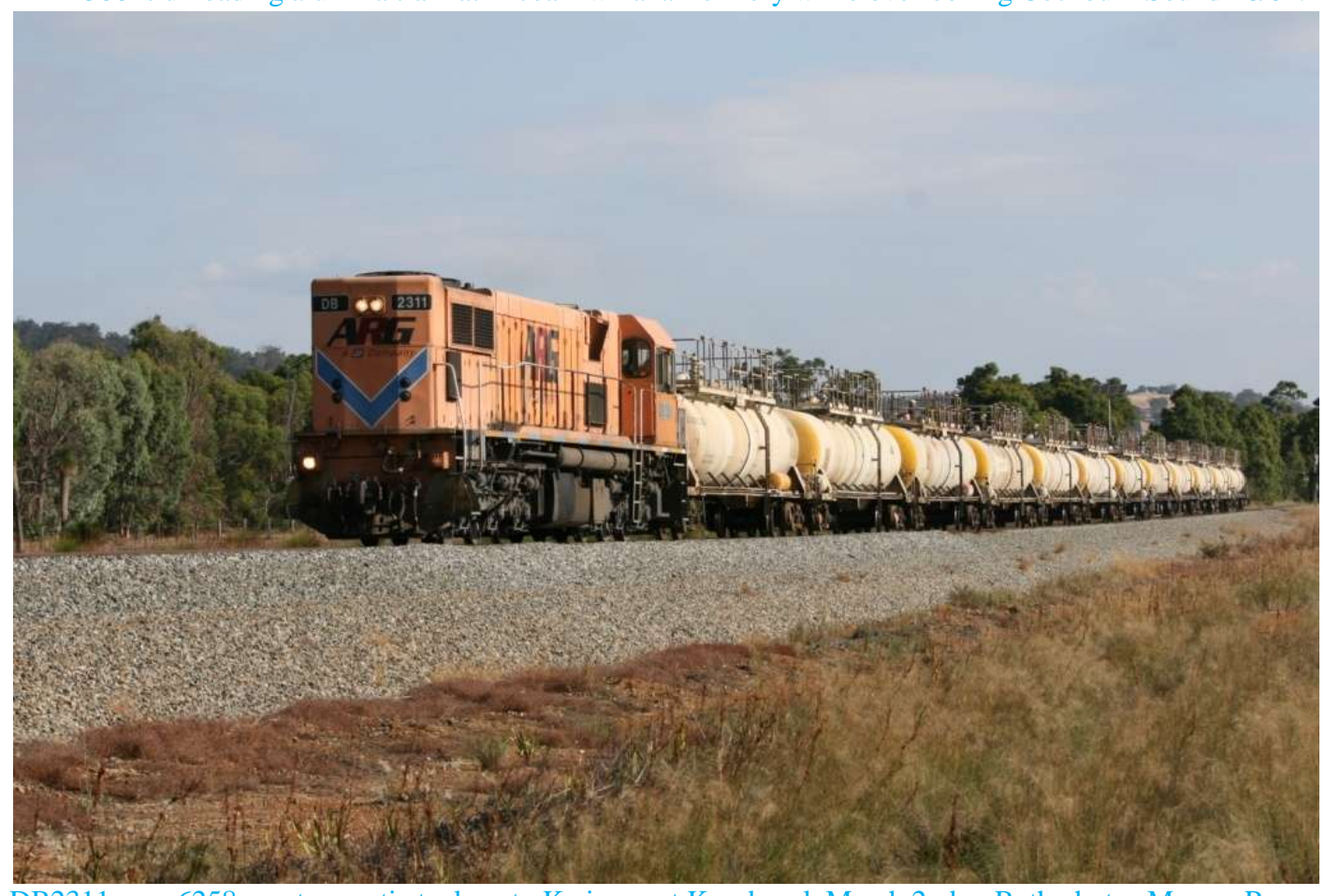
DB2311 runs 6258 empty caustic tankers to Kwinana at Keysbrook March 2nd.