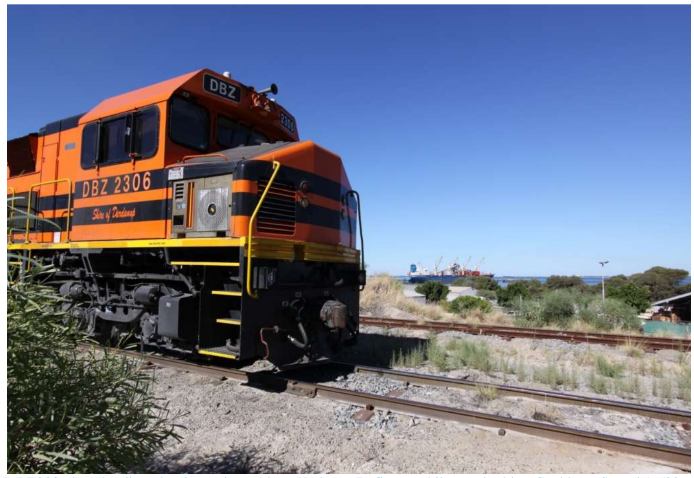
DBZ2306 is unloading alumina train at Alcoa Kwinana Refinery while overlooking Cockburn Sound 16/02.