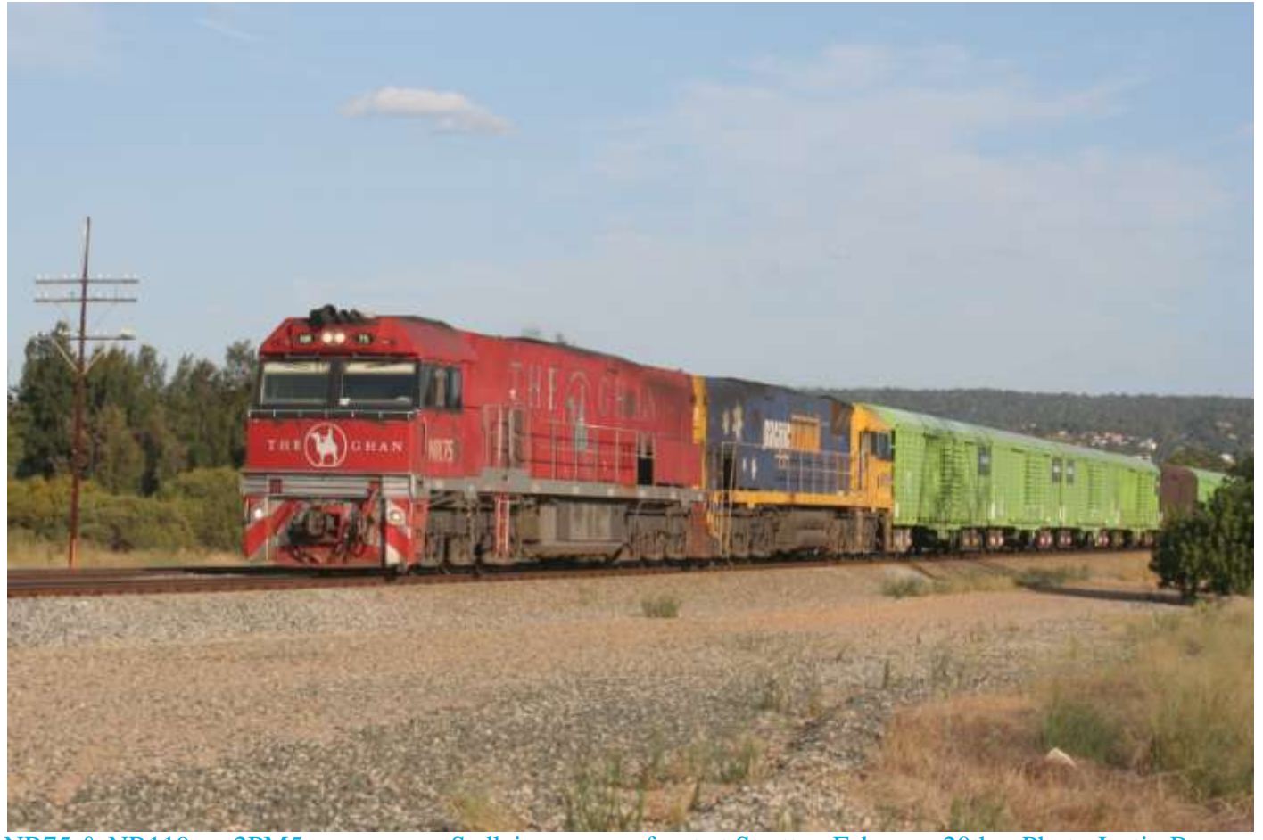
NR75 & NR119 on 2PM5 no crew car Sadleirs vans on front at Stratton February 20th.