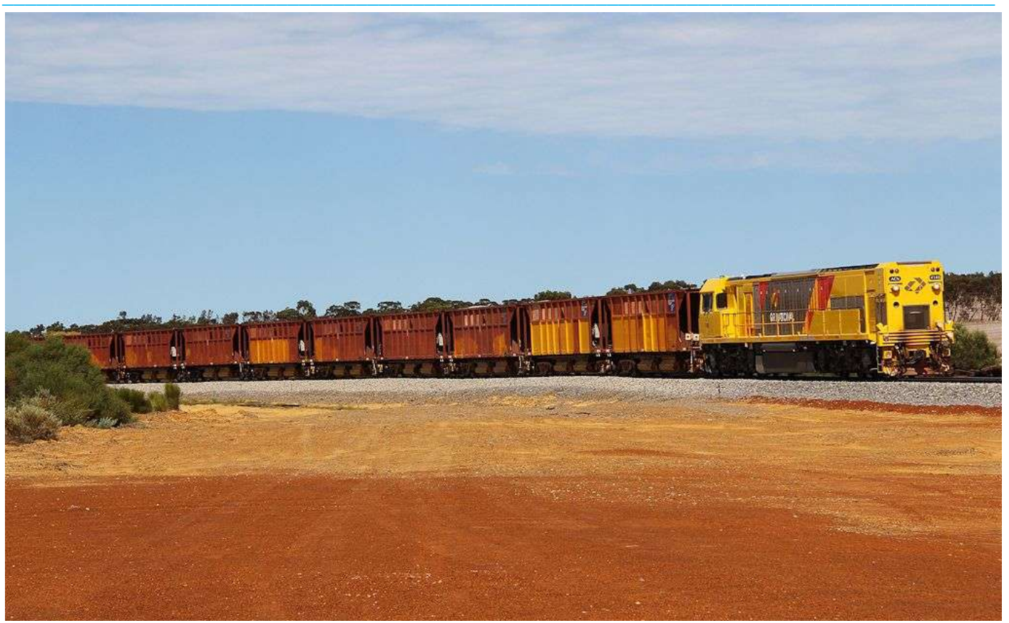
ACN4148 runs rake of CHAY ballast wagons into Kemp siding to reload March 5th.

Mineral sand service to Eanebba from Narngulu recomenced on January 22nd but in recent weeks has again been suspended resuming on March 4th on usual overnight timetable. Final mineral sands service before resumption ran on August 30th 2010 that at the time looked like the end of the Dongara to Eneabba line.