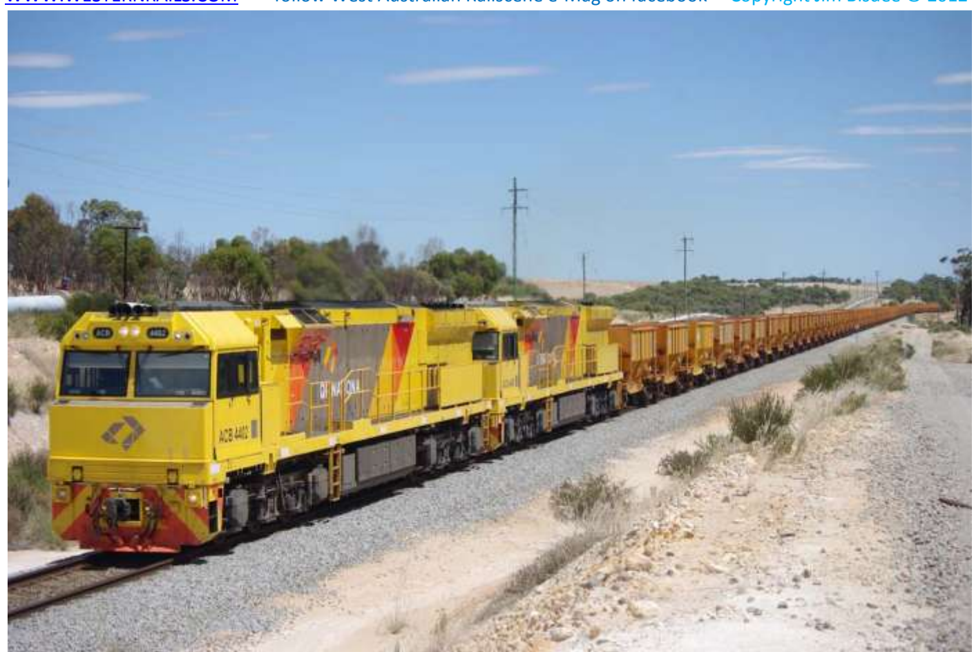
ACB4402 & ACB4406 on 1035 empty ore train at Grass Valley March 4th.

West Australian Railscene e-Mag is published weekly by Jim Bisdee on rail happenings on West Australian Railroads WWW.WESTERNRAILS.COM follow West Australian Railscene e-Mag on facebook Copyright Jim Bisdee © 2012