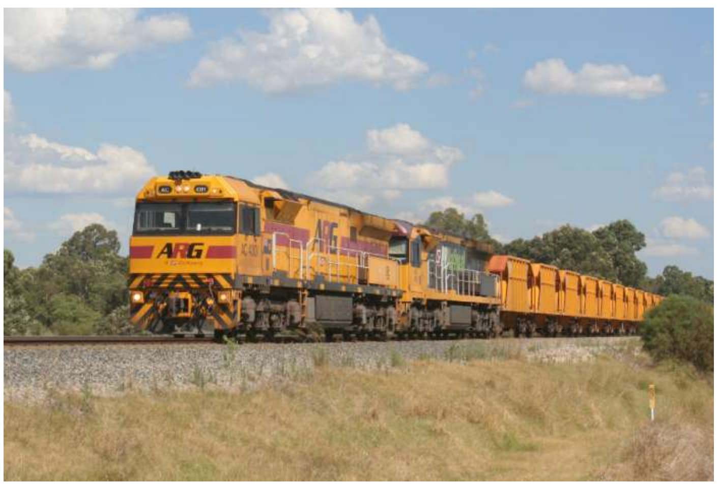
AC4301 & ACA6002 on 3035 empty ore train at Woodbridge February 21st.