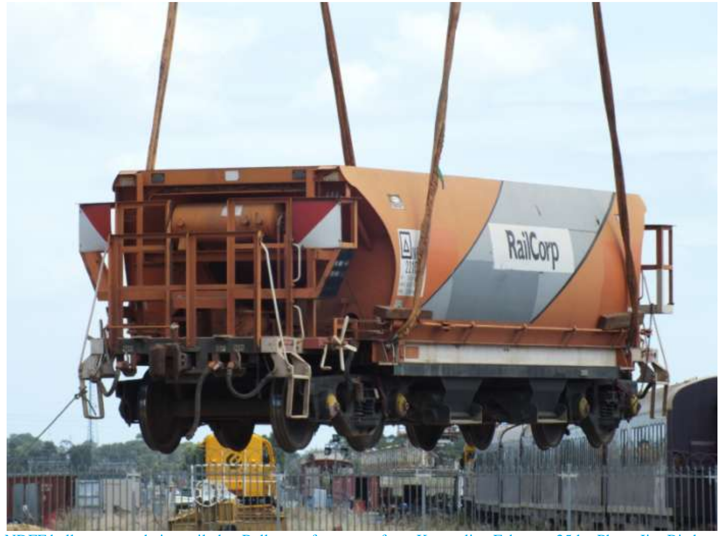
NDFF ballast wagon being railed at Bellevue after return from Karara line February 25th.