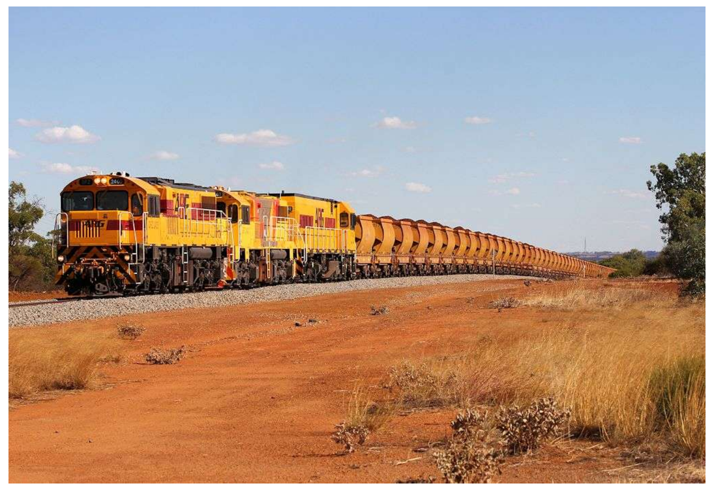
DFZ2405, DFZ2403 & P2502 on loaded Mt Gibson ore train at Morawa March 5th.