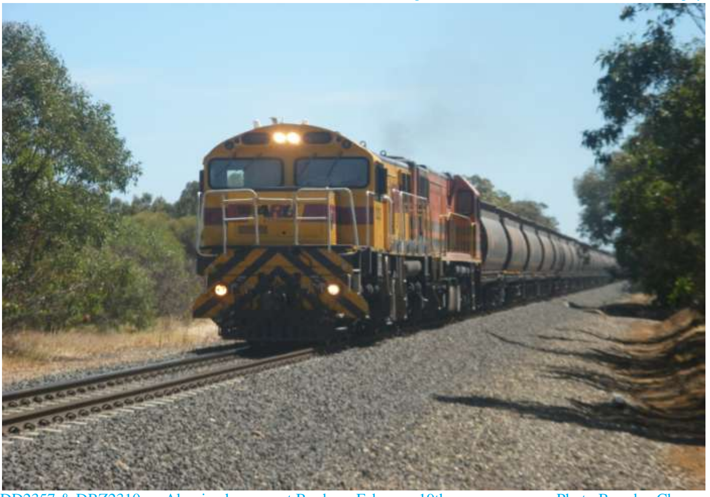
DD2357 & DBZ2310 on Alumina hoppers at Bunbury February 19th.