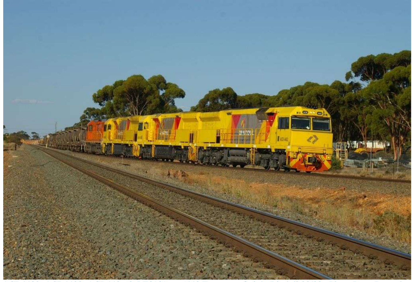
ACB4402, ACB4403, ACB4406 & LZ3109 on 5443 Esperance freight Binduli 08/03.