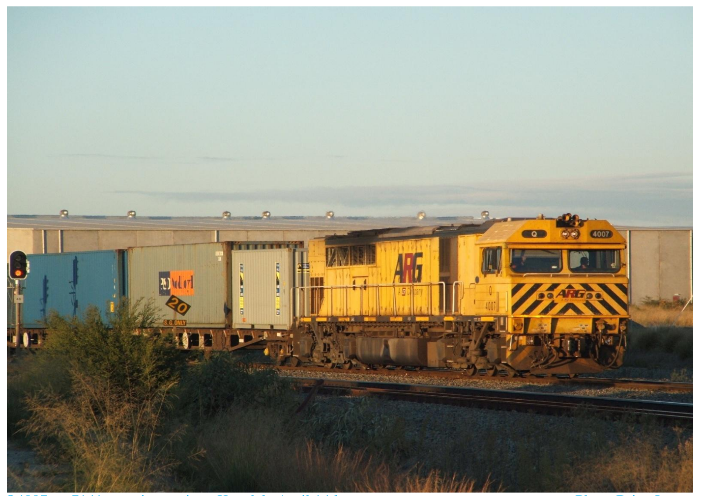
Q4007 on 7141 container train at Kewdale April 14th.