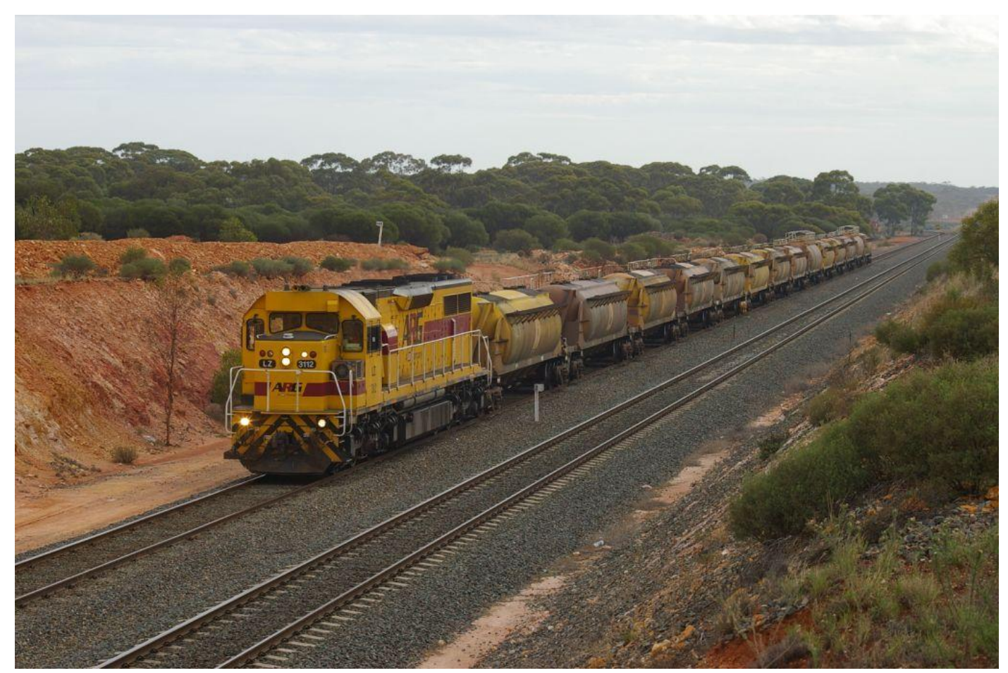
LZ3112 on 6478 empty nickel train at West Kalgoorlie March 31st.