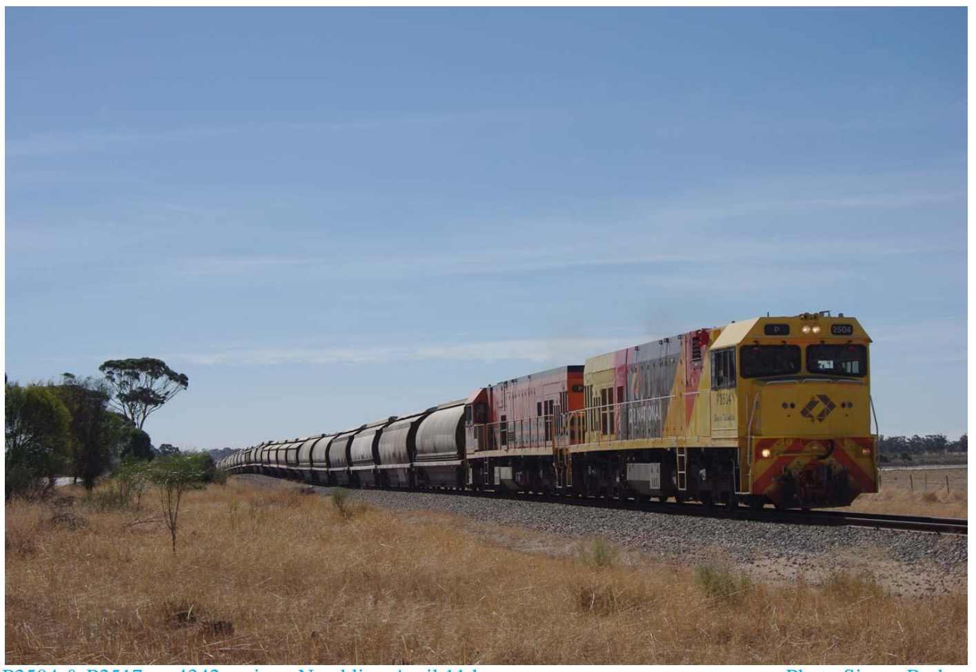
P2504 & P2517 on 4342 grain at Nambling April 11th.