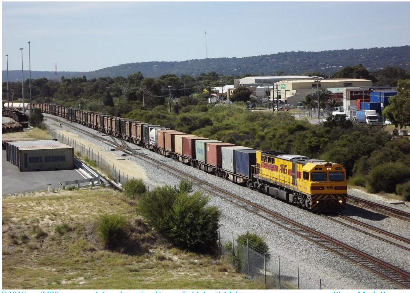
Q4019 on 3430 empty sulphur departing Forrestfield April 11th.