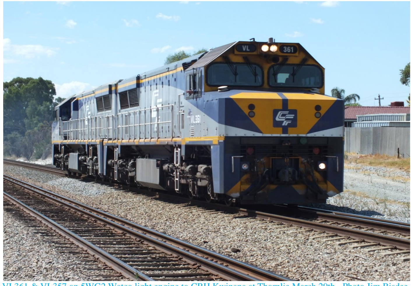
VL361 & VL357 on 5WG2 Watco light engine to CBH Kwinana at Thornlie March 29th.