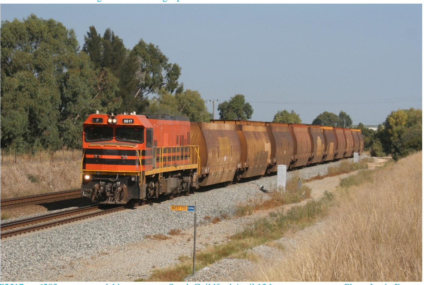
P2517 on 6283 empty woodchip wagons at South Guildford April 13th.