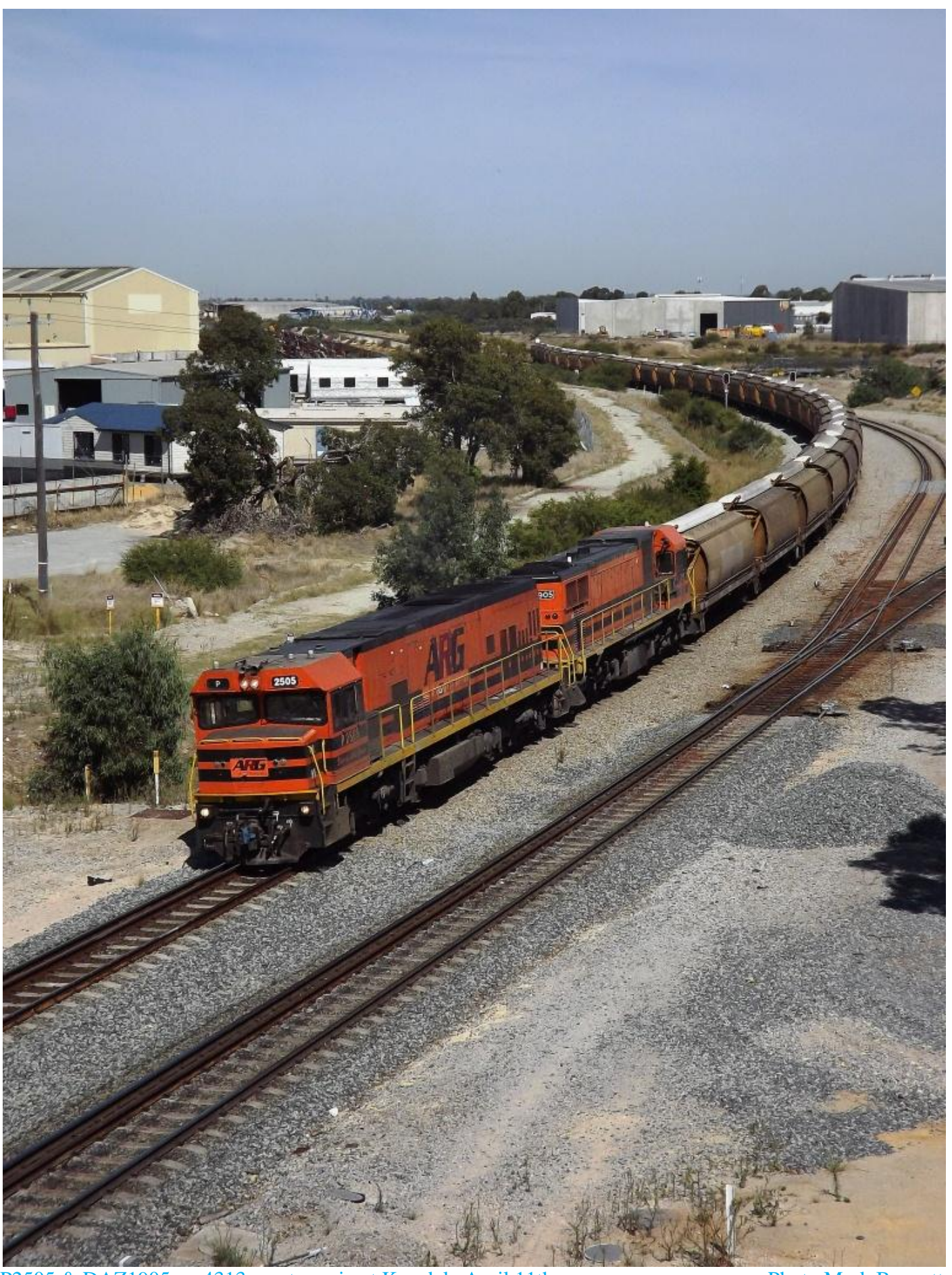
P2505 & DAZ1905 on 4313 empty grain at Kewdale April 11th. END page 10 of 10.