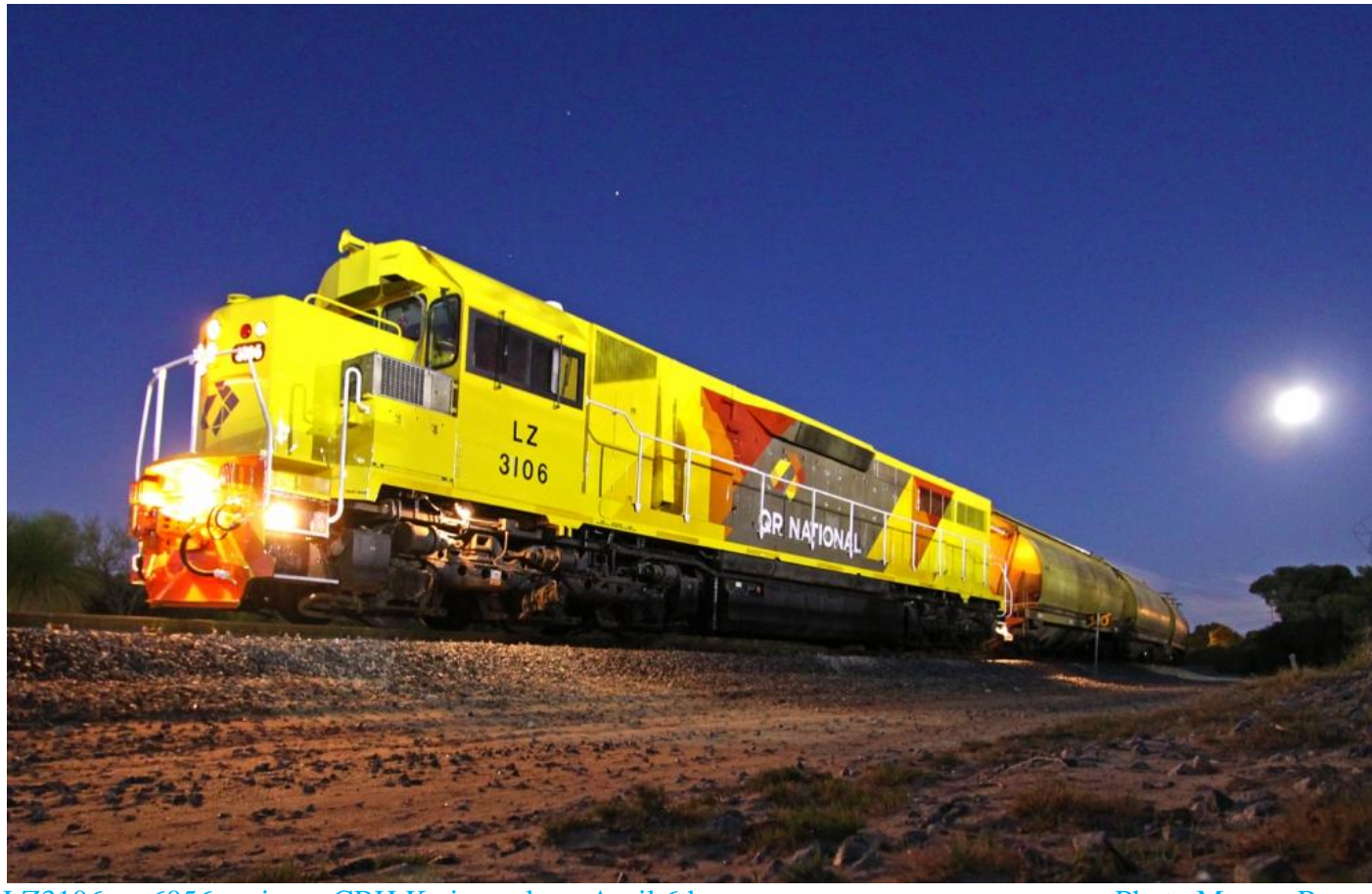
LZ3106 on 6056 grain on CBH Kwinana loop April 6th.