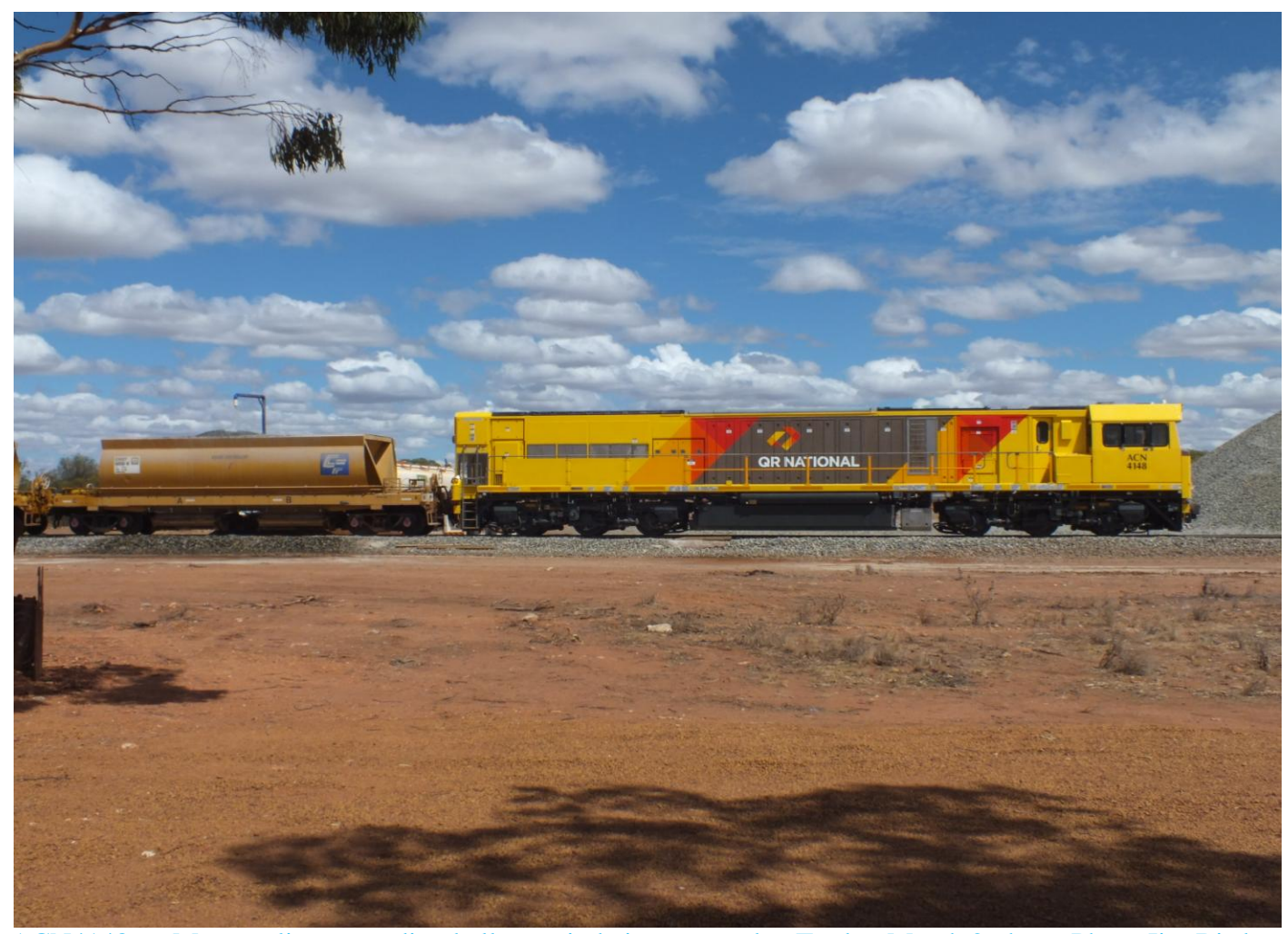
ACN4148 on Morawa line upgrading ballast train being watered at Tardun March 26th.