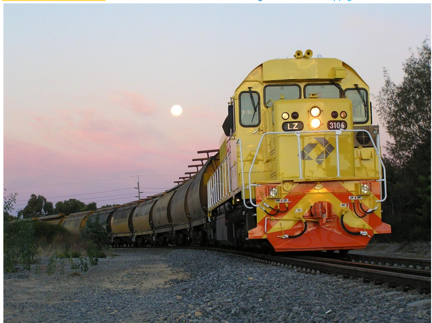
Full moon rises above LZ3106 on 6056 grain on CBH loop Kwinana April 6th.

West Australian Railscene e-mag is published weekly by Jim Bisdee on rail happenings on West Australian Railroads WWW.WESTERNRAILS.COM follow West Australian Railscene e-Mag on facebook Copyright Jim Bisdee © 2012