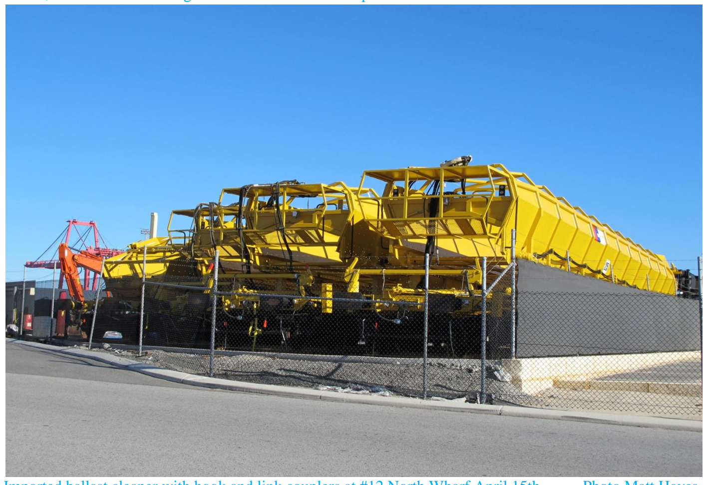
Imported ballast cleaner with hook and link couplers at #12 North Wharf April 15th.