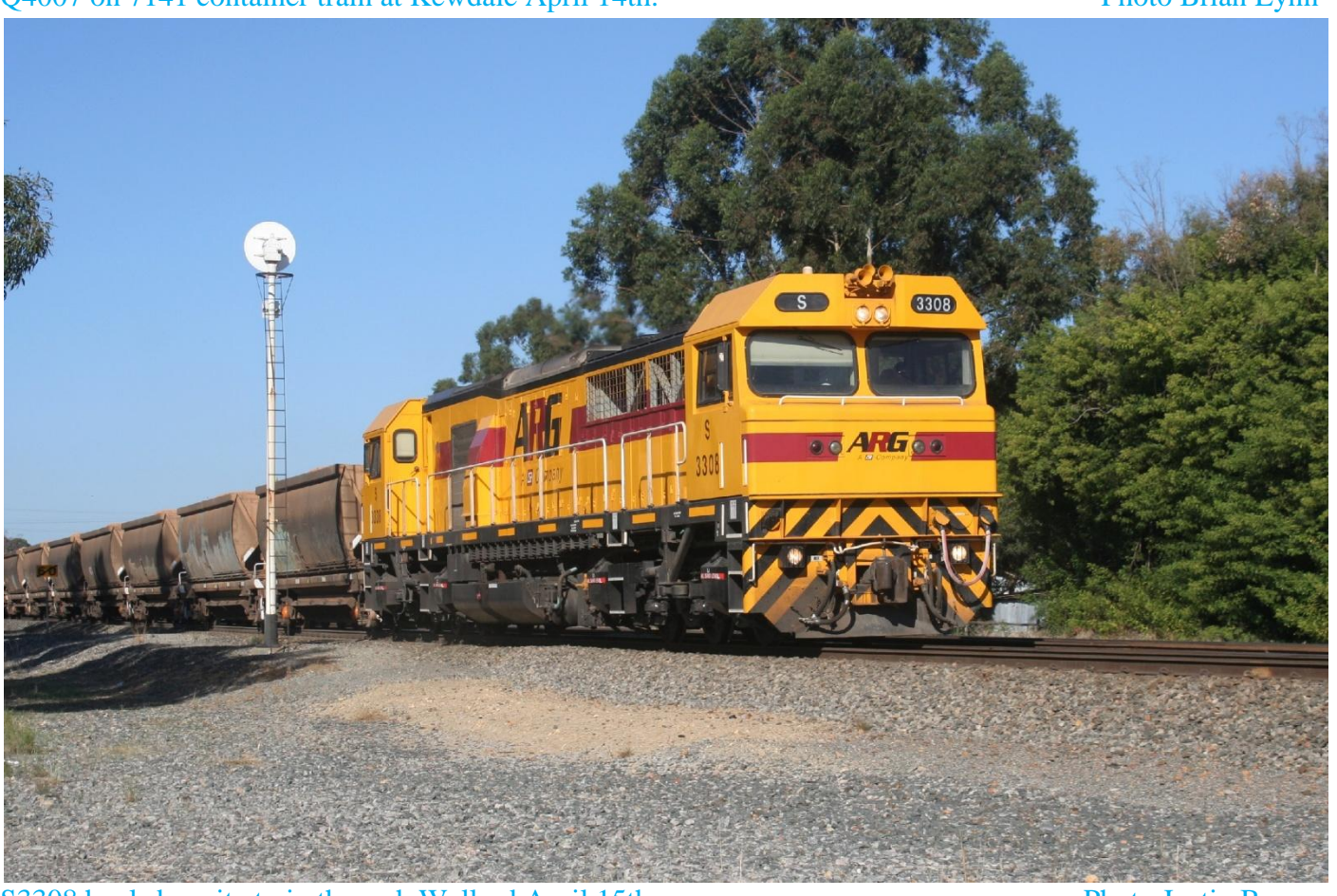
S3308 hauls bauxite train through Wellard April 15th.