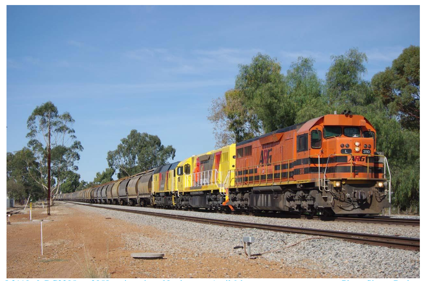
L3110, & DC2205 on 2058 grain train at Northam on April 9th.