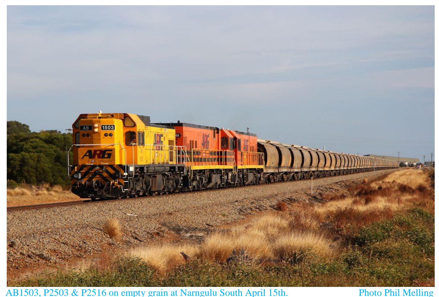
AB1503, P2503 & P2516 on empty grain at Narngulu South April 15th.