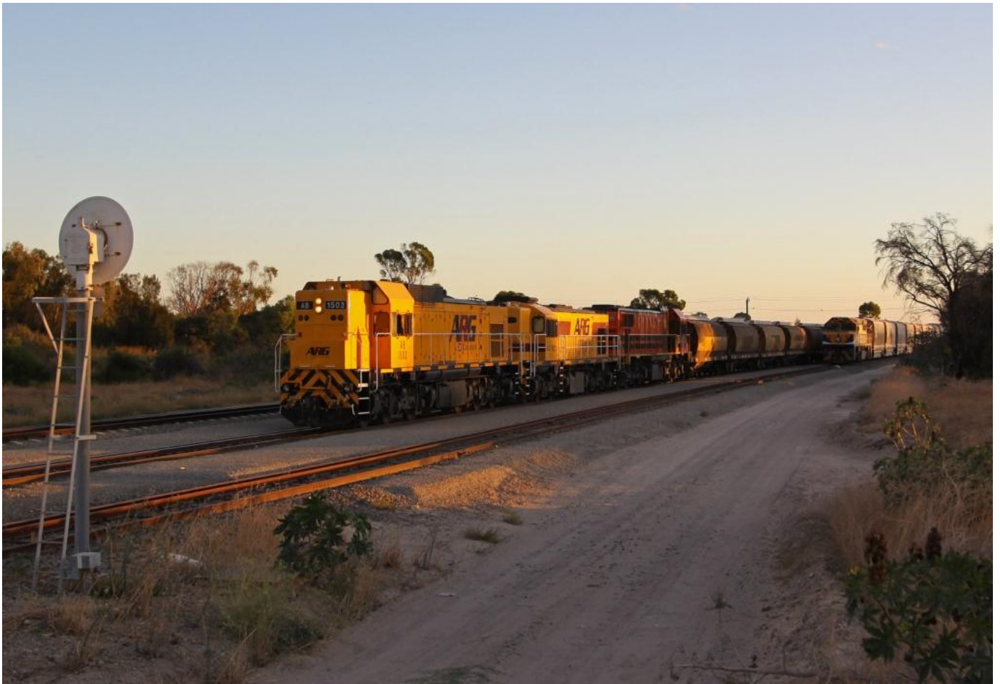
AB1502, AD1521 & DAZ1905 pass VL361 stalled on CBH wagons at Kwinana 25/03.