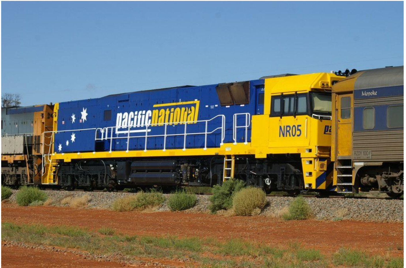
NR5 numbered as 05 remote unit on 6PM7 at Parkeston April 21st.