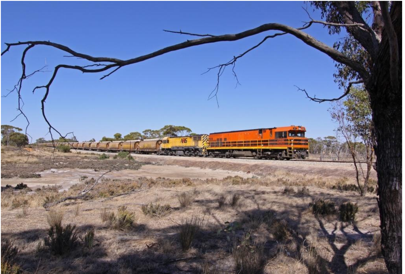
P2507 & DAZ1906 on 7313 empty grain south of Calingiri April 14th.