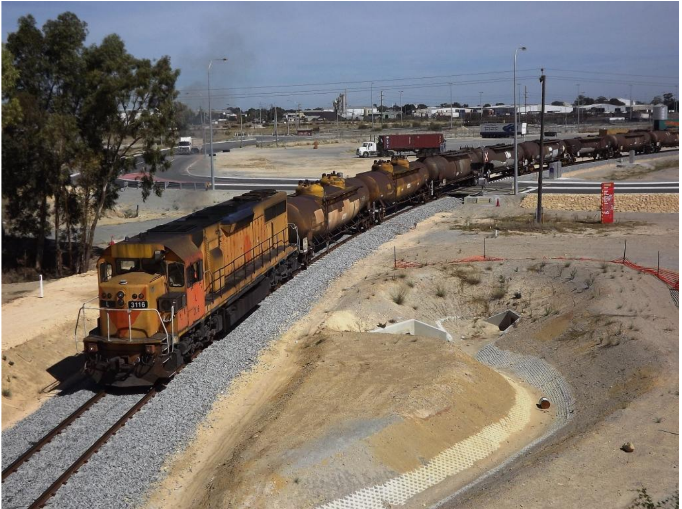
L3116 on 4SG4 tankers ex BP terminal Kewdale to Forrestfield April 11th.

Around 0800 on April 14th a contractor cut a feed cable where work on City Link Project is taking place west of Perth City Station. This cut power to the Clarkson line back to Whitfords where services could only operate Clarkson to Whitfords causing severe disruption to the suburban system for the third time in just over a month. This at least was a Saturday with far fewer people affected but it still caused huge disruption to services having trains only running on northern section of the line. Both Transperth and Adams Bus lines were called in to supply buses run to a rail replacement service Perth to Whitfords. Power was restored about 1050 with services returning to normal by 1230.