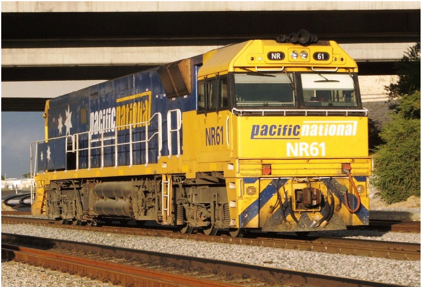
NR61 Pacific National Kewdale yard shunter under Tonkin Highway Bridge April 18th.