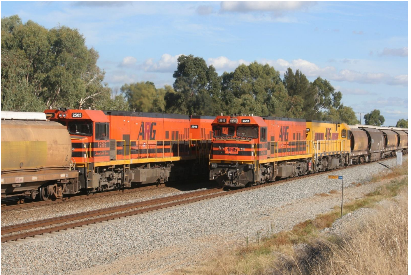
2512 & P2511 on empty grain crosses P2506 & P2505 on grain South Guildford 16/04.