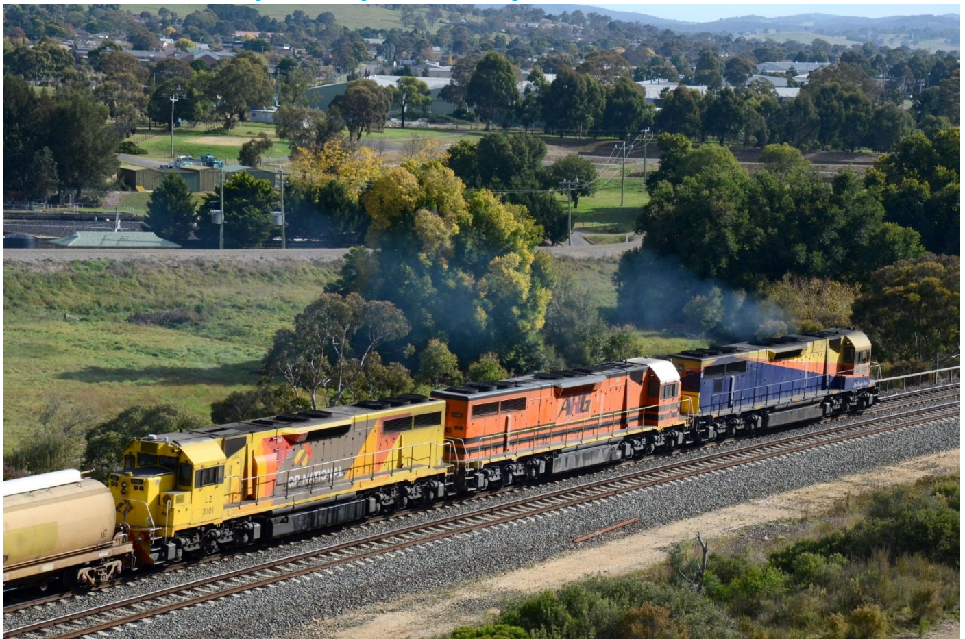
LQ3122, LZ3104 & LZ3101 on 3958 grain at Goulburn North on April 16th.