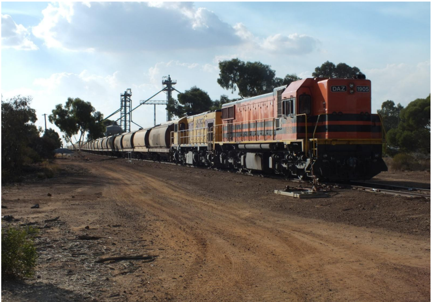
DAZ1905 & AD1520 shunt 2342 grain train at Ballidu March 26th.