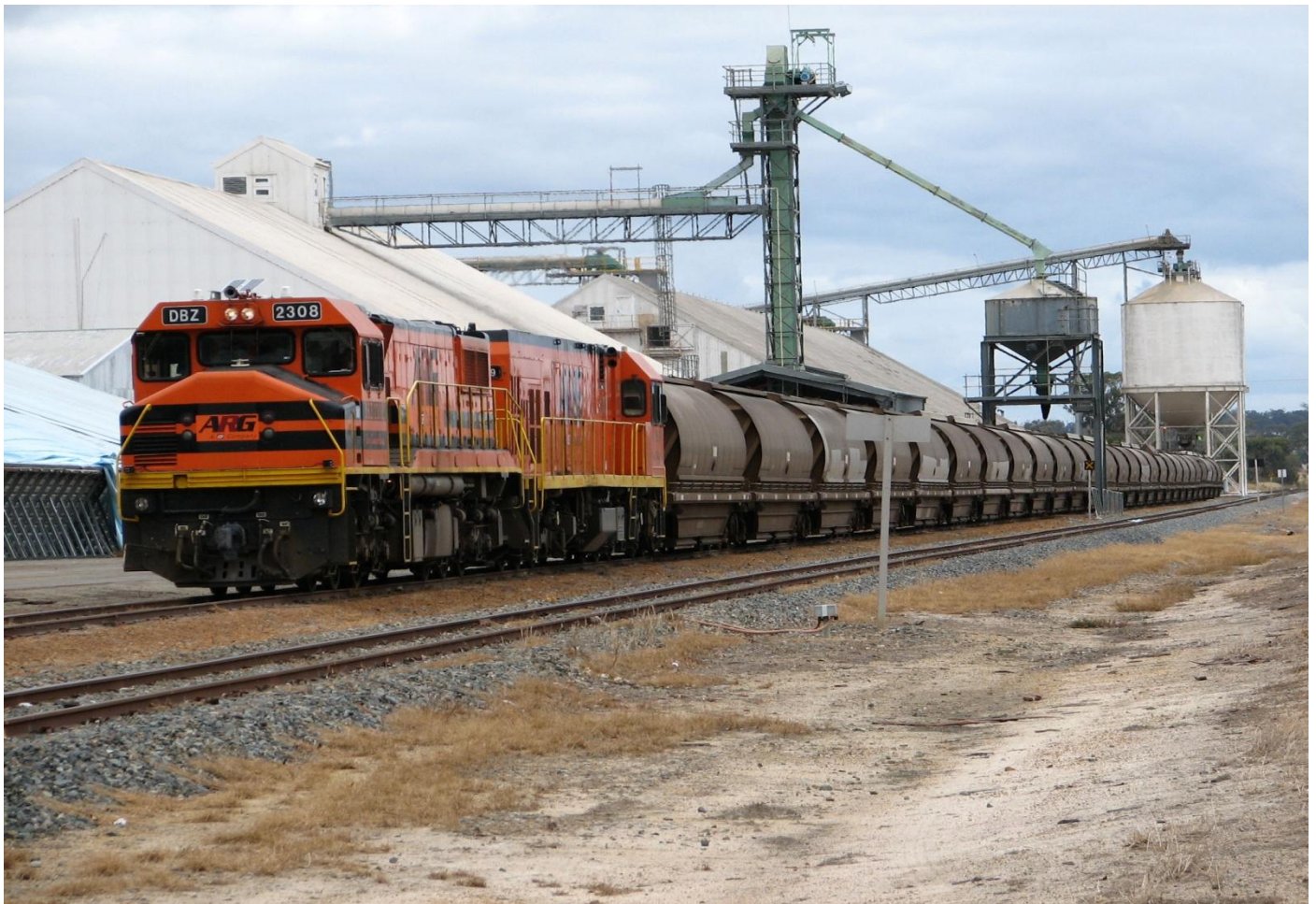
DBZ2308 & P2509 on 5372 grain loading at Cranbrook April 19th.