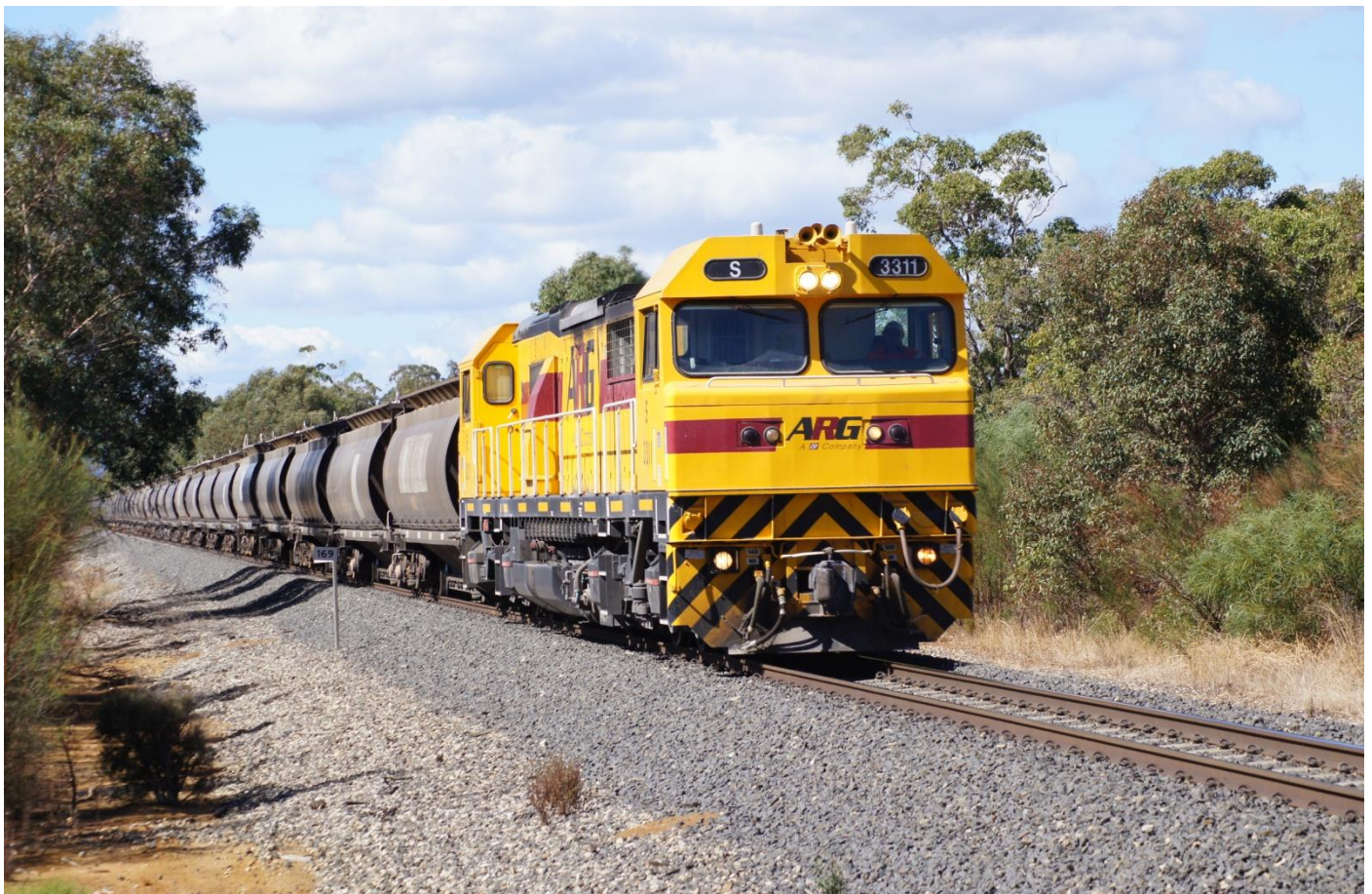
S3311 on alumina hoppers to Bunbury at Waterloo April 14th.