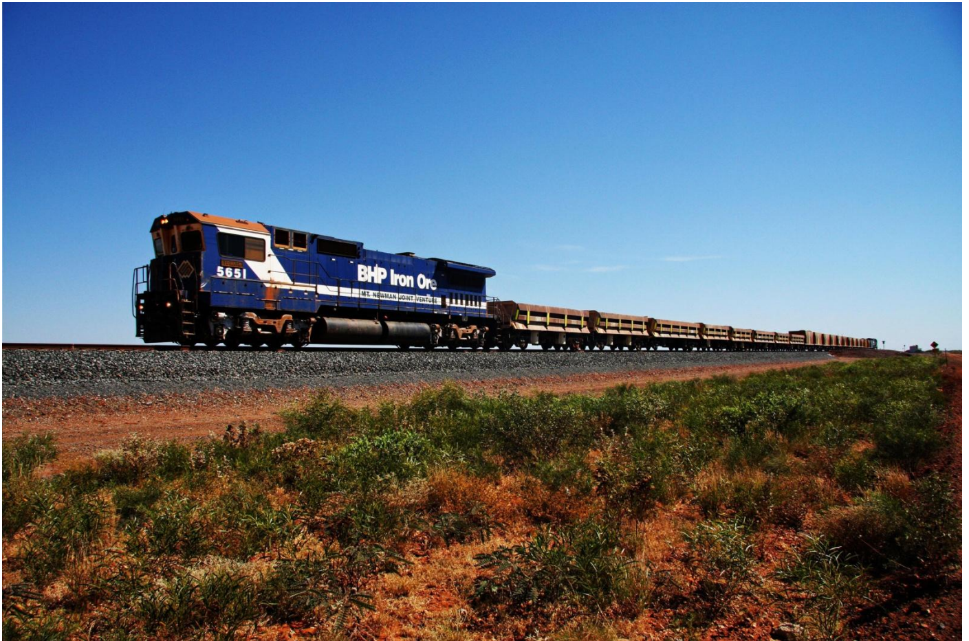
5651 on works train side dump cars and ballast wagons with 5657 on rear at Walla 19/04.