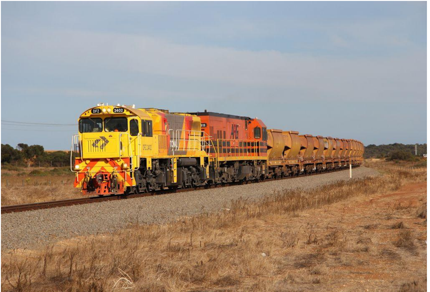
DFZ2402 & P2513 on empty ore train on way to Narngulu Yards from port April 15th.