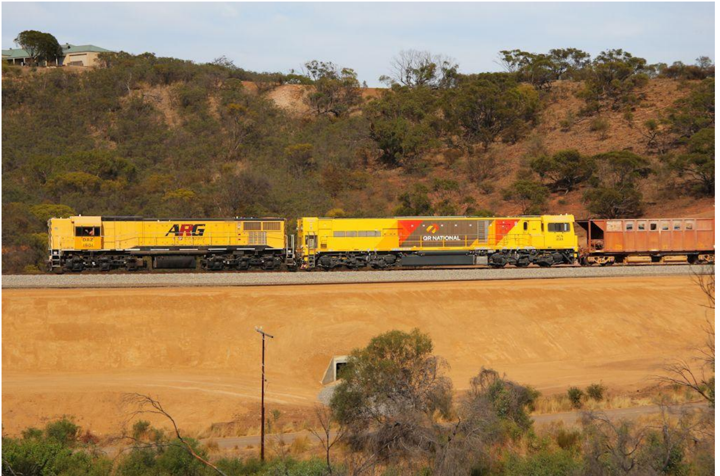
DAZ1901 & ACN4149 on loaded ballast train at Bringoo April 15th.