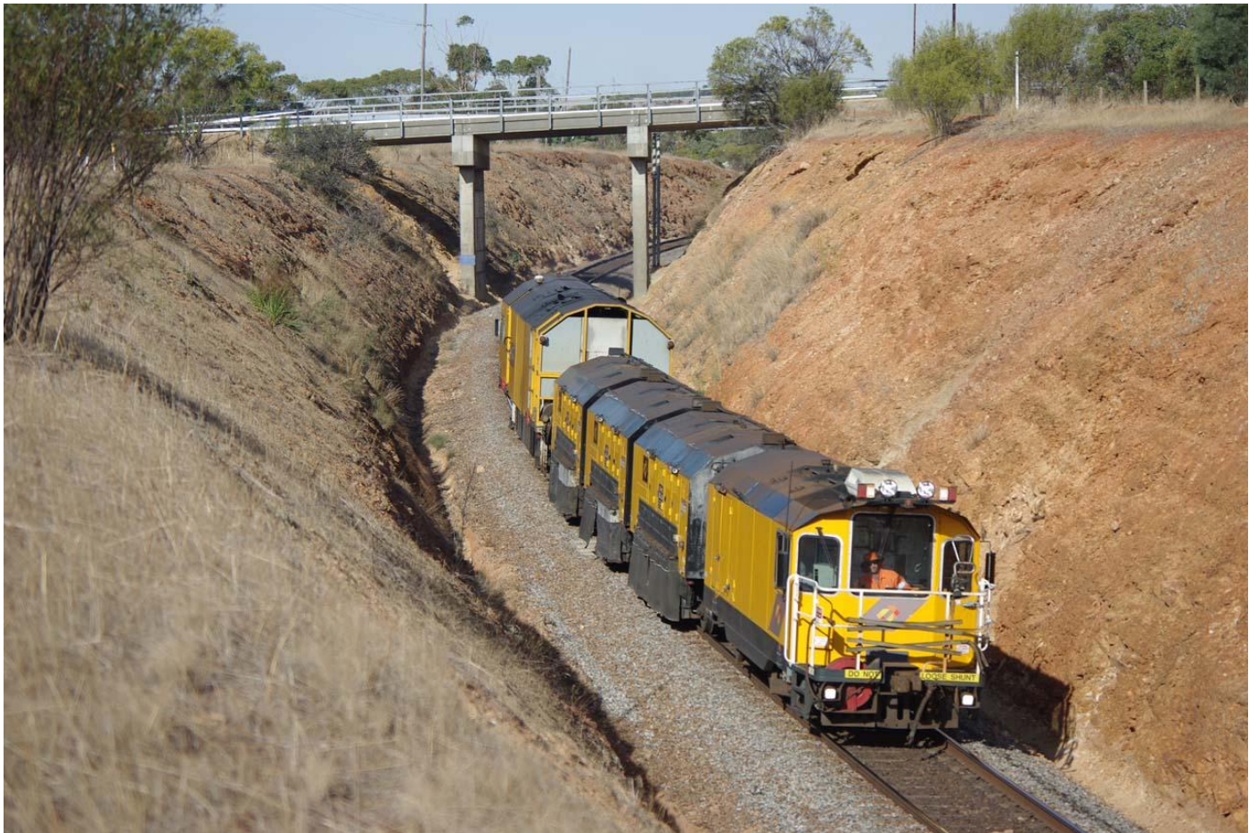
Loram rail grinder in the cutting at Grass Valley on April 11th.