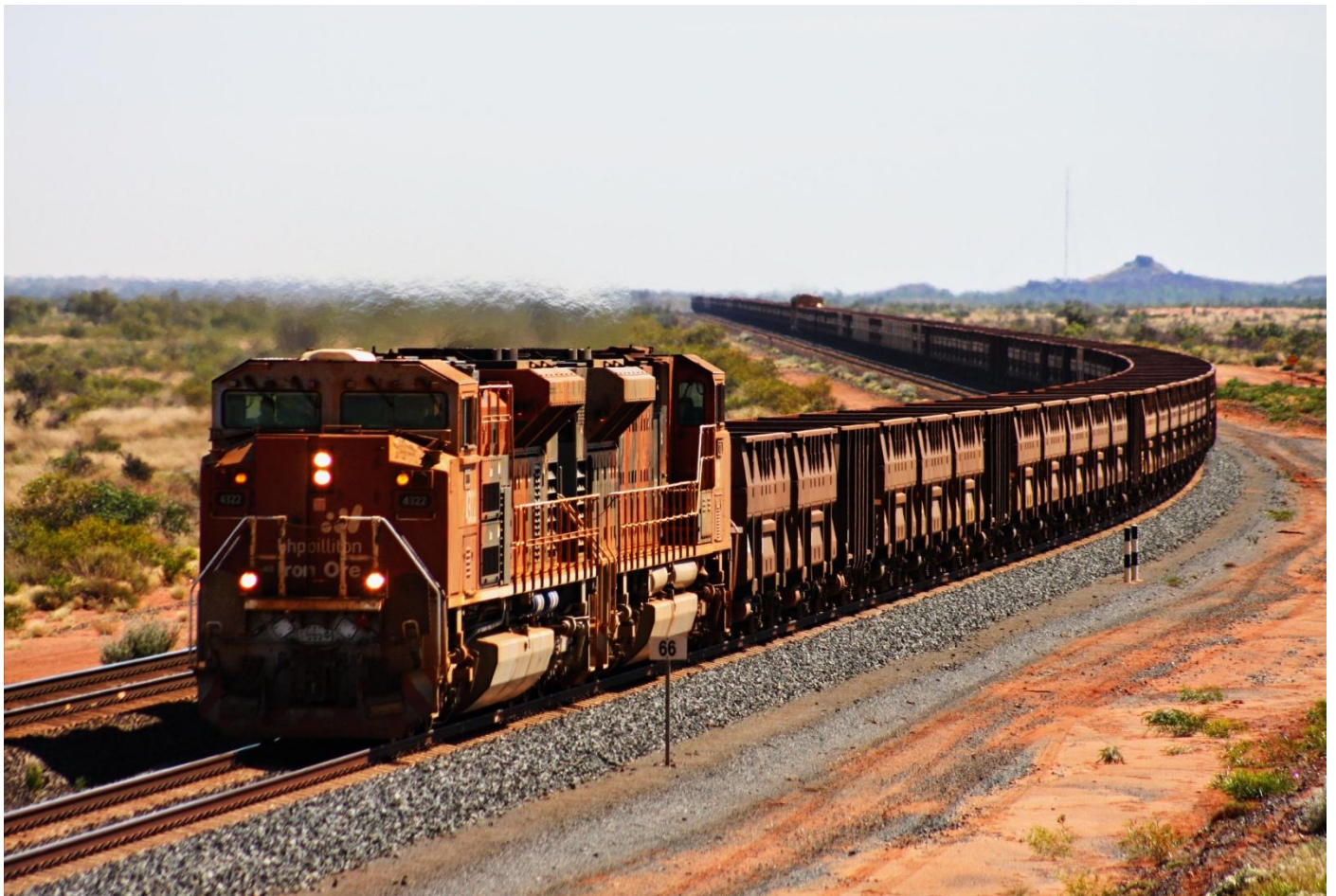
5422, 5409 with DPU 4354 & 4338 on an empty ore train at Walla April 19th.