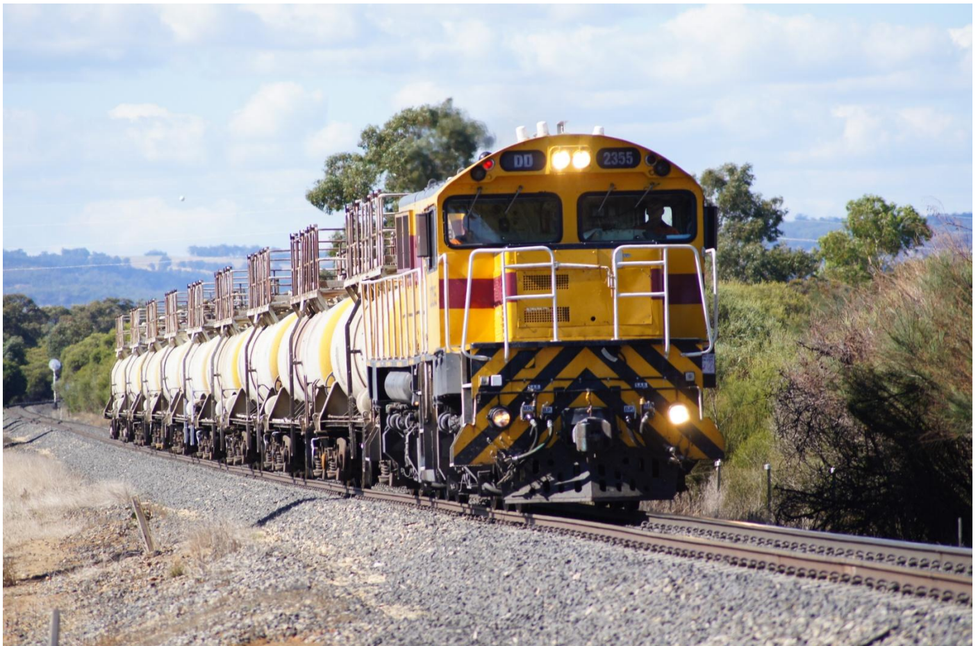
DD2355 on empty caustic tankers at Waterloo April 14th.