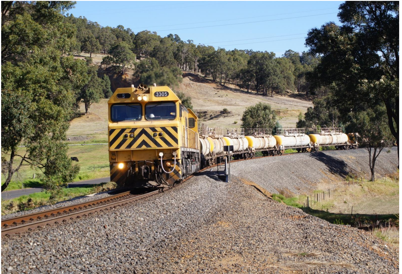
S3305 on caustic tankers climbing grade at Olive Hill on Collie line April 15th.