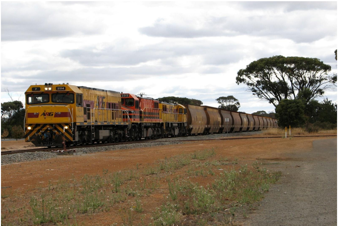
P2514, DBZ2312 & DD2356 on 5307 woodchip wagons at Tambellup April 19th.