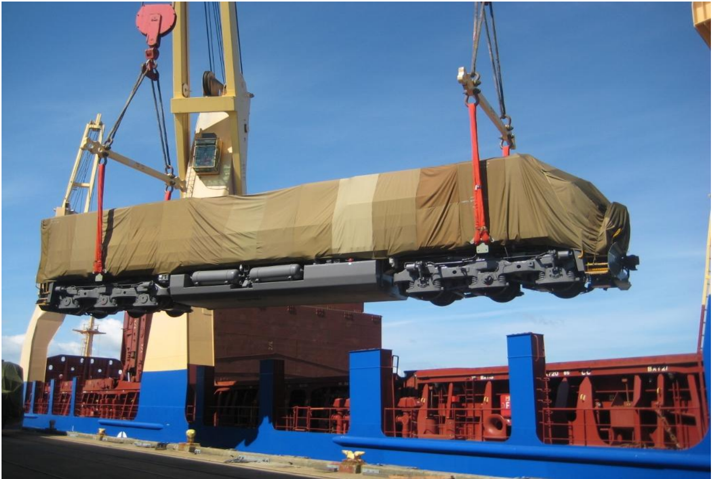
Rio Tinto ES44DCi locomotive being hoisted onboard BBC Nile Lamberts Point April 2nd.