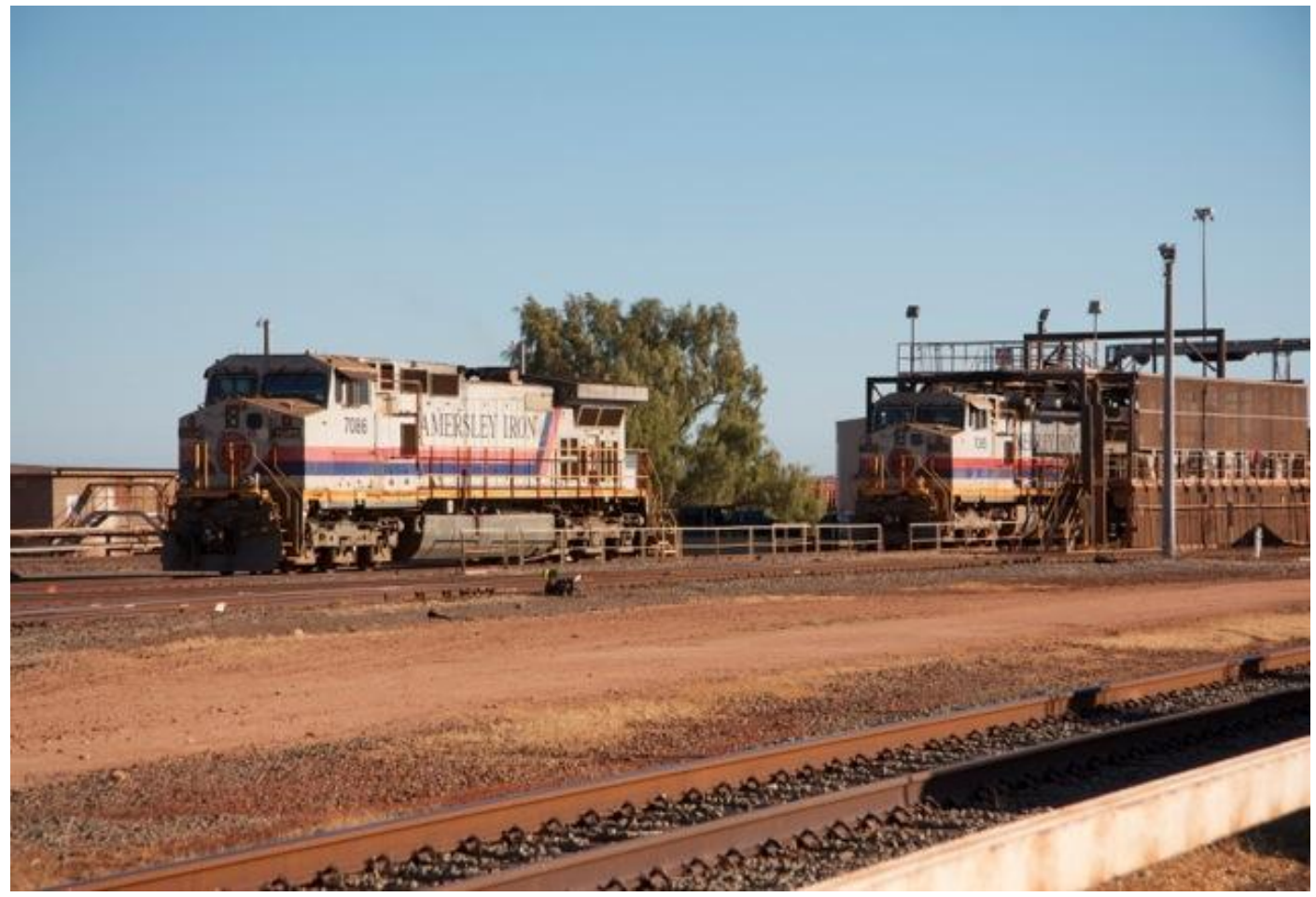
Hamersley Iron CW44-9W #7066 and 7068 in 7 Mile Yard May 30th.