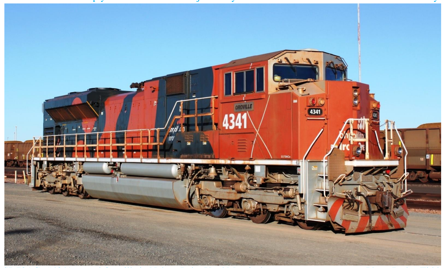
SD70ACe #4341 named Oroville in Nelson Point Yard May 26th.