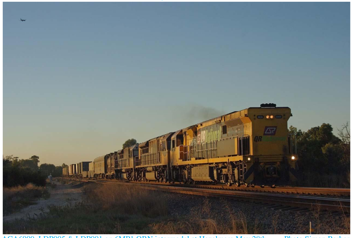
ACA6009, LDP005 & LDP001 on 6MP1 QRN intermodal at Hazelmere May 28th.