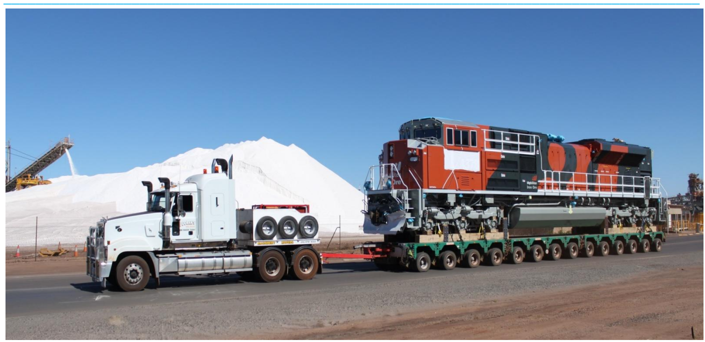
SD70ACe on transport float being hauled from Port Hedland Town wharf to hardstand at Nelson Point to be placed on rails to allow commissioning May 26th.

The unwired crossover at North Fremantle used to access old Leighton shunting yard that has seen little use in recent years has been wired to enable EMUs to crossover. This gives a fourth crossover on the Fremantle line and the first on the western end of the line that has increased Transperth flexibility to be able to deal with problems and reverse services if required.