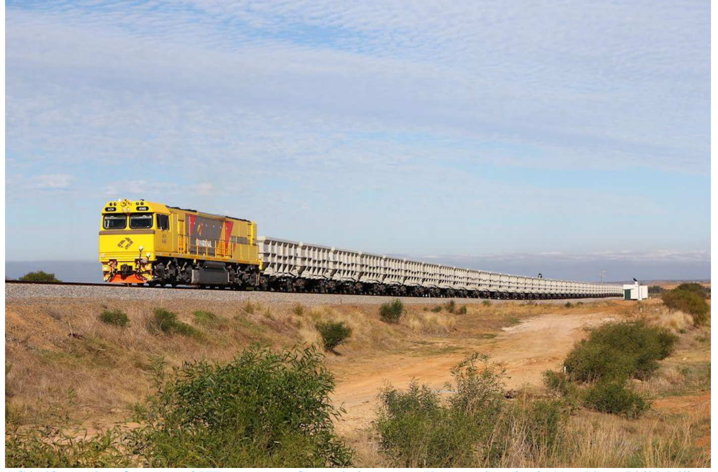
AC4148 on rake of empty AOKF ore cars at Grants being run to Karara mine site 21/5.