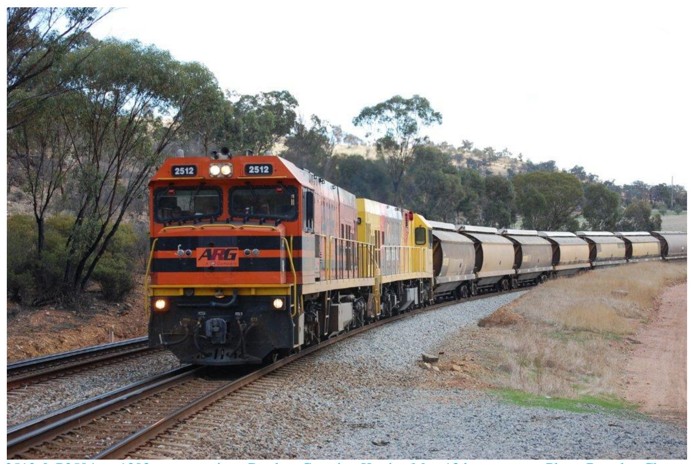
2512 & P2504 on 1303 empty grain at Donkey Crossing Katrine May 13th