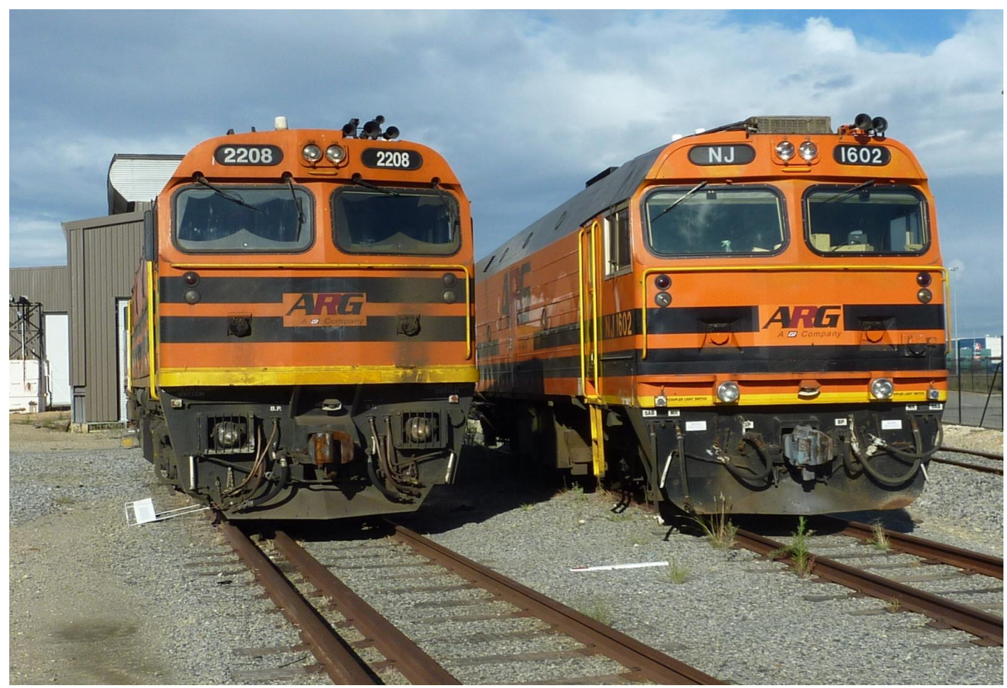
2208 & NJ1602 at Forrestfield have simular cabs but are different gauges May 31st.