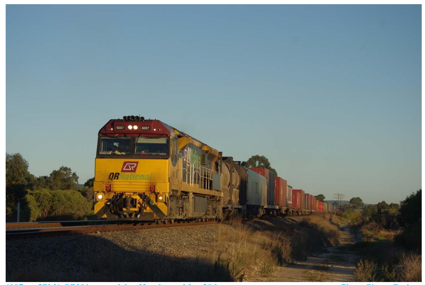
6007 on 2PM1 QRN intermodal at Hazelmere May 28th.