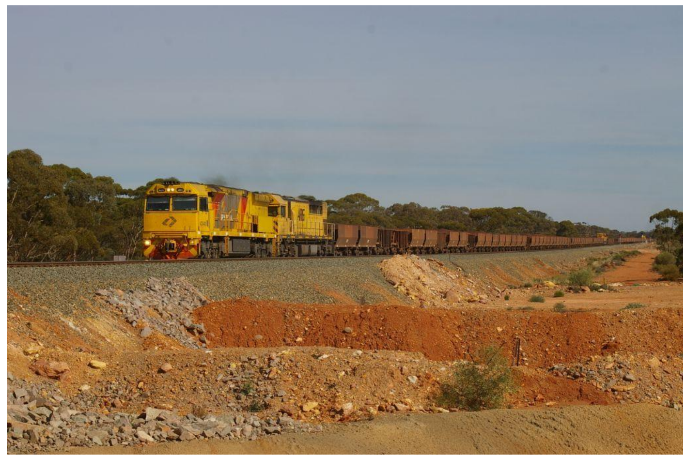
ACB4402, Q4007 on 7415 loaded DPU ore train at Binduli with Q4011 & AC4305 remote units at 53 cars and 106 cars from the head end of the train May 26th.