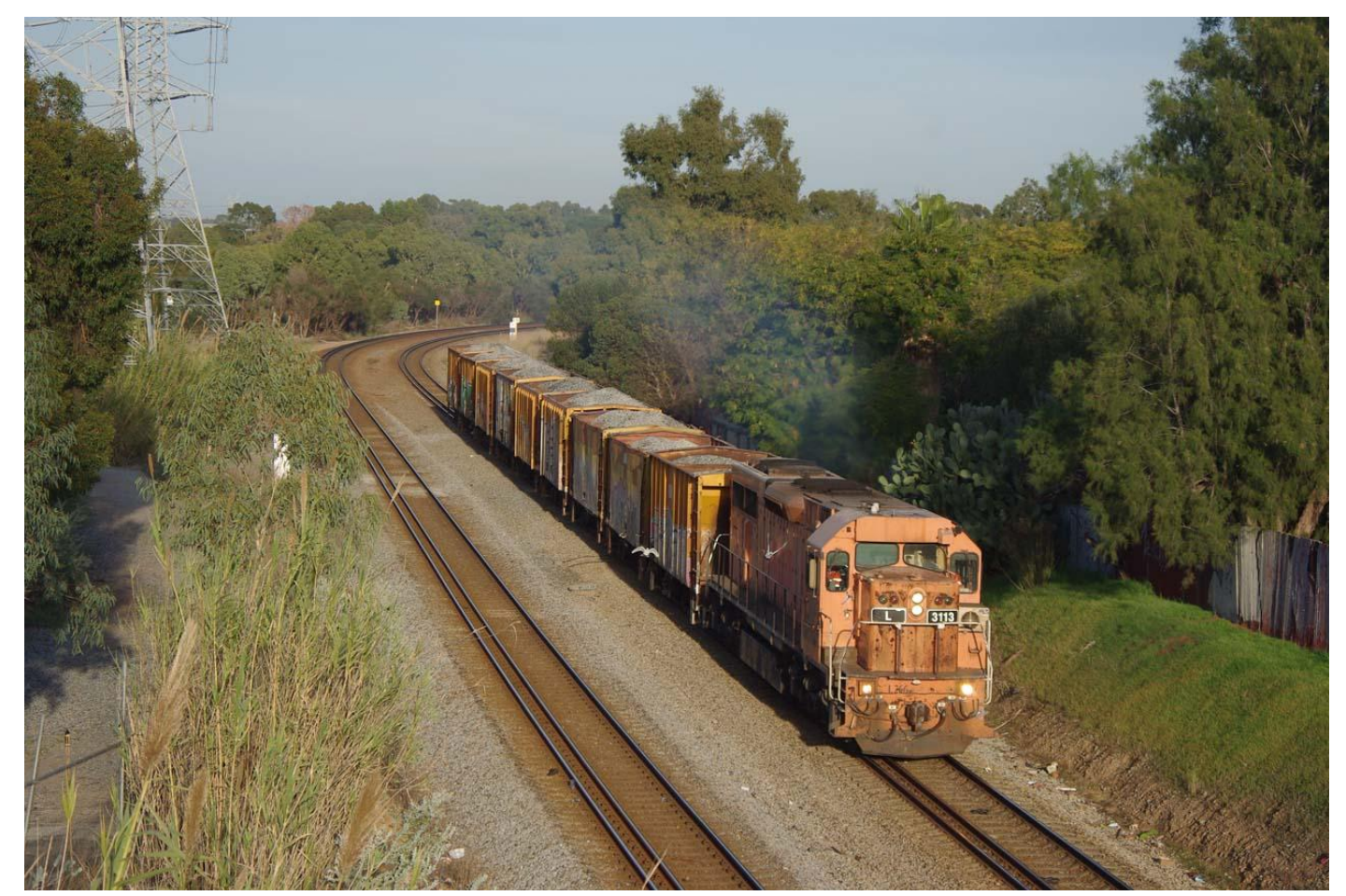
L3113 on 7BT1 ballast train at Bellevue on May 26th.