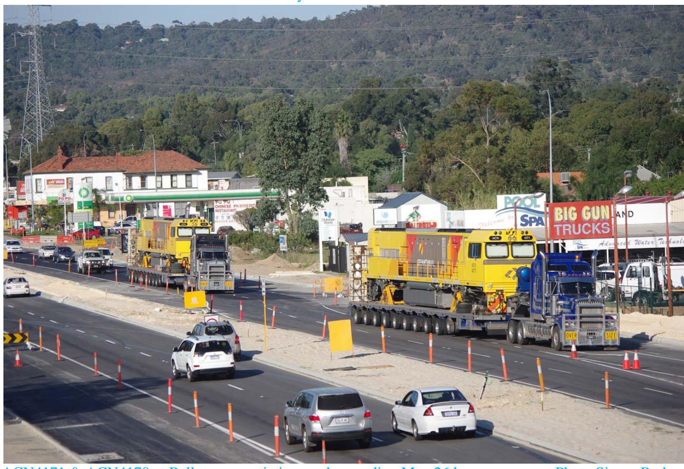
ACN4171 & ACN4170 at Bellevue negotiating road upgrading May 26th.