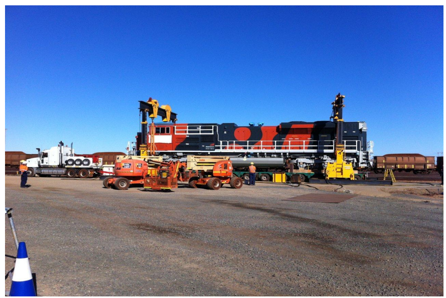
4378 being lifted off the transport float at Nelson Point hardstand area on May 27th.