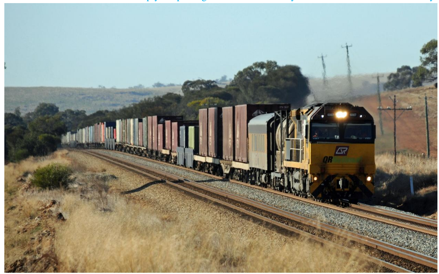
6007 on late 5MP1 climbing through Katrine May 27th having hauled this service over 2300kms after LDP008 failed at Spencer Junction on 25th.

Transperth locomotive MA1862 overhaul continues at Gemco Forrestfield while overhaul of SCT K208 continues at Gemco Bellevue.