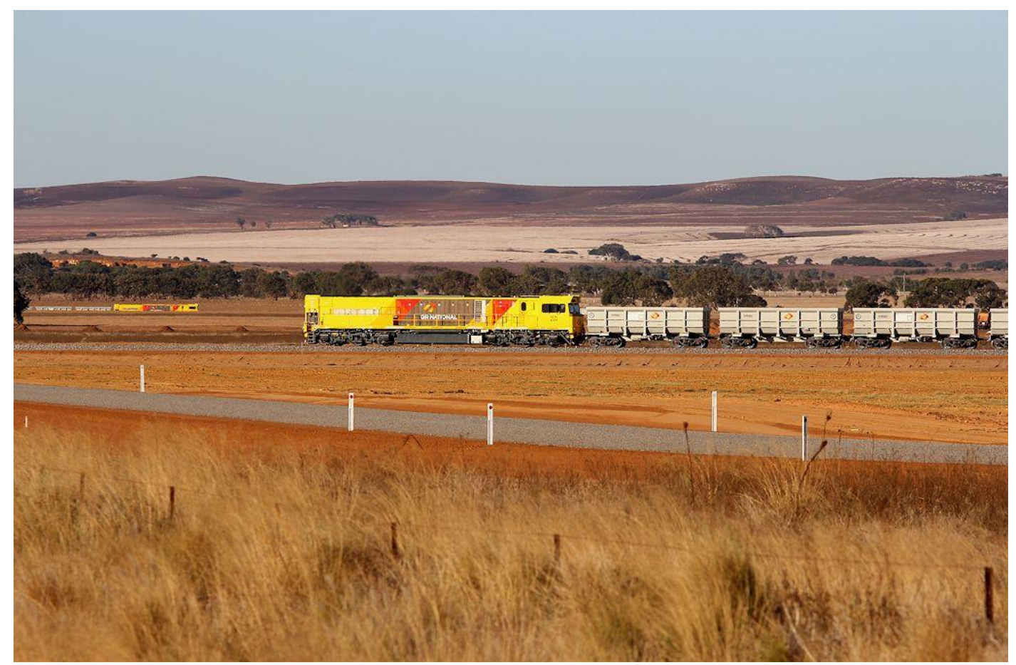
ACN4149 hauling rake of AOKF ore cars at new QR Narngulu East Yard with ACN4148 also on a rake of AOKF ore cars in distance May 20th.