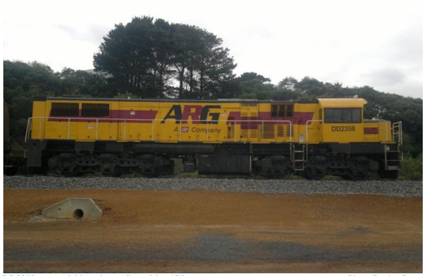
DD2358 on woodchip train at Albany May 17th.