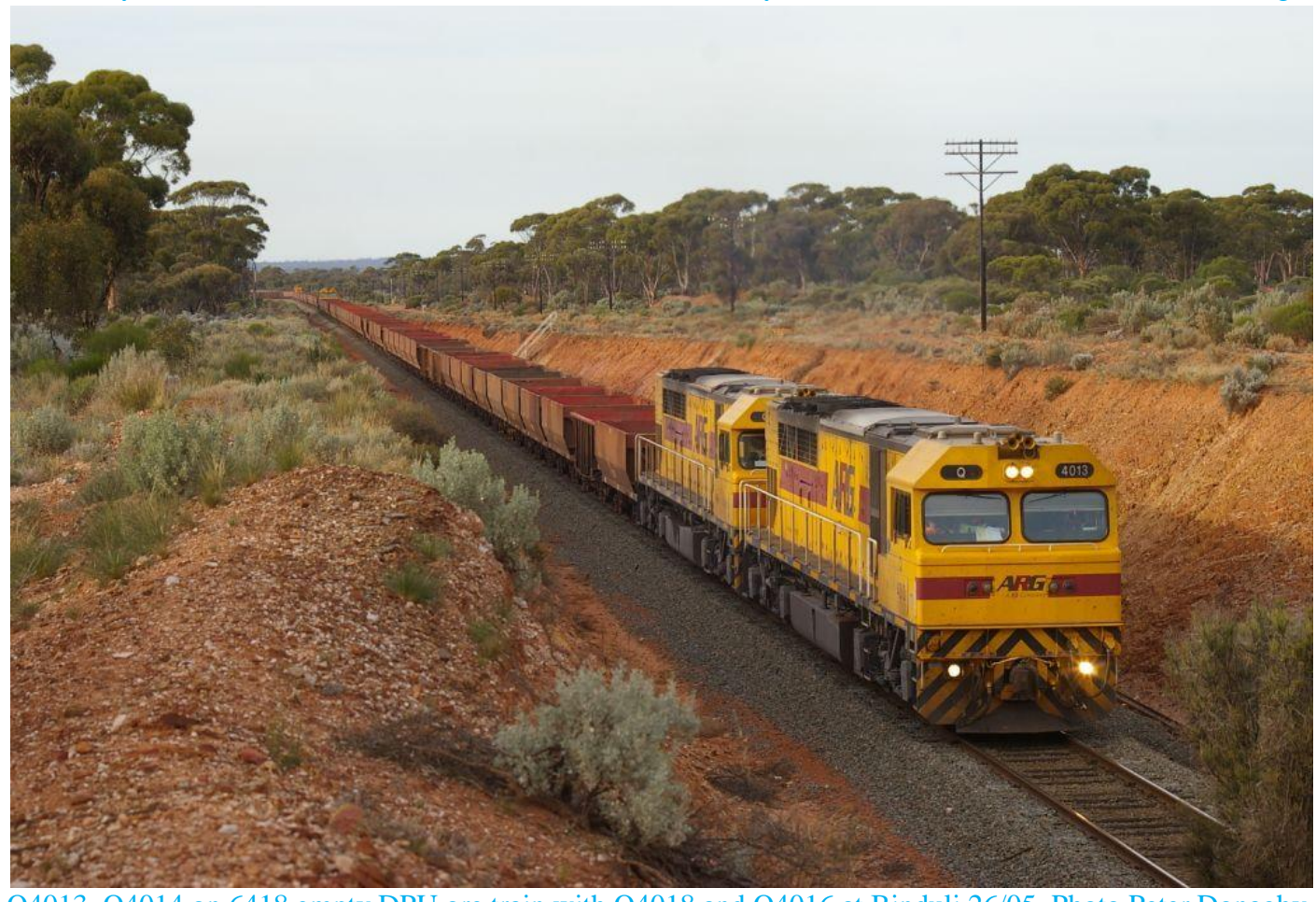
Q4013, Q4014 on 6418 empty DPU ore train with Q4018 and Q4016 at Binduli 26/05.