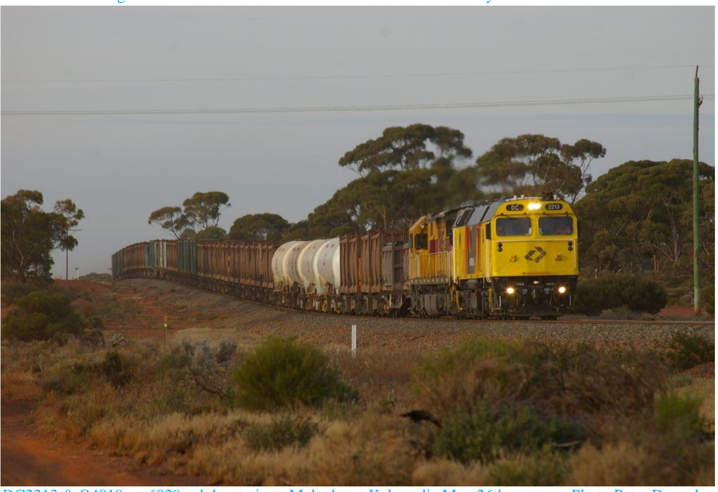
DC2213 & Q4019 on 6029 sulphur train to Malcolm at Kalgoorlie May 26th.