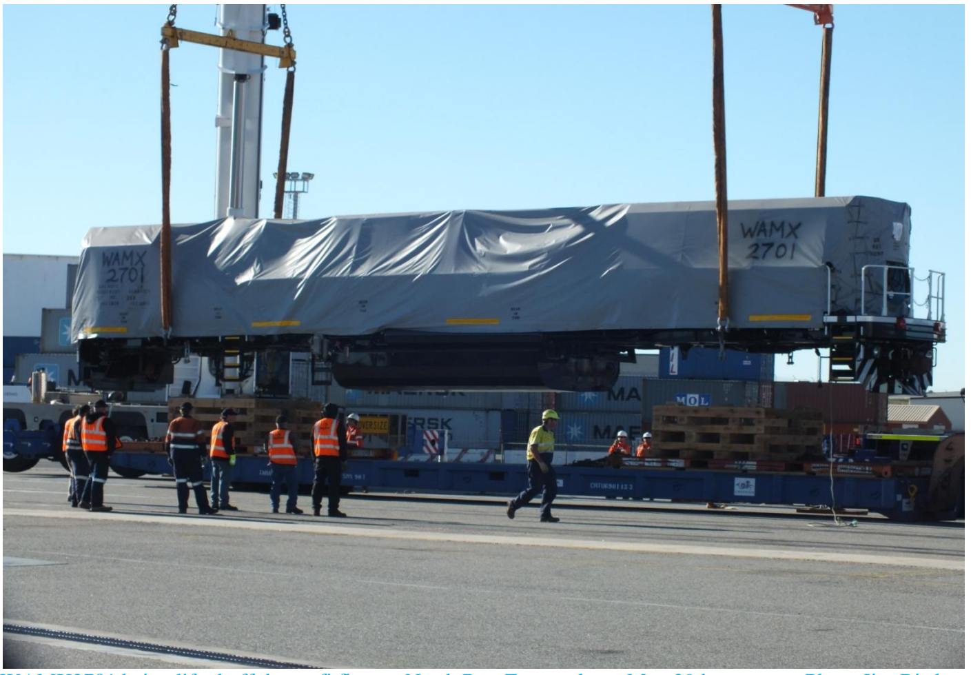
WAMX2701 being lifted off the mafi float at North Port Fremantle on May 29th.