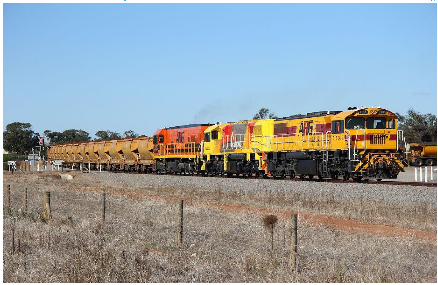
DFZ2405, DFZ2402 & P2503 back loaded ore train form the port into Narngulu yard for stabling during the shutdown at Geraldton Port May 19th.