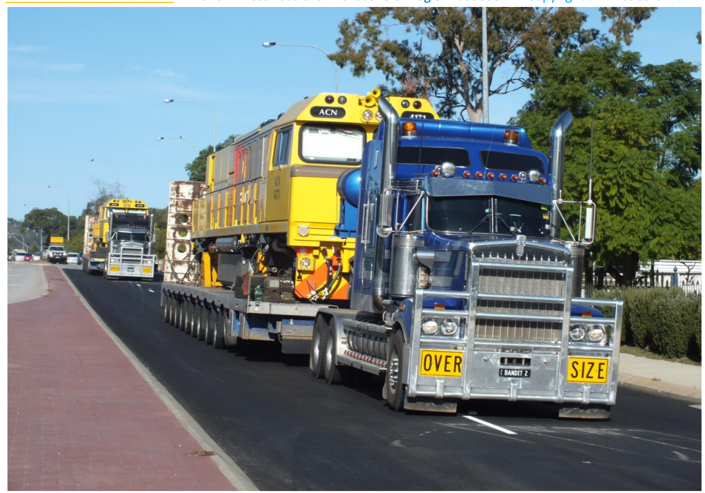
ACN4171 with ACN4170 behind on transport floats descending Greenmount on May 26th nearly at the end of their journey being hauled across Australia from Redbank Qld to Forrestfield WA. Photo Jim Bisdee

West Australian Railscene e-Mag is published weekly by Jim Bisdee on rail happenings on West Australian Railroads. WWW.WESTERNRAILS.COM follow West Australian Railscene e-mag on facebook Copyright Jim Bisdee © 2012