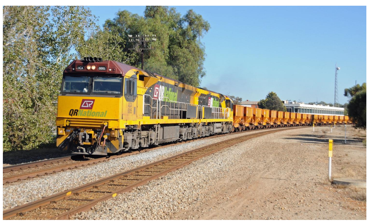
ACA6005 & ACA6012 on 1035 empty ore passing Northam Station May 27th.