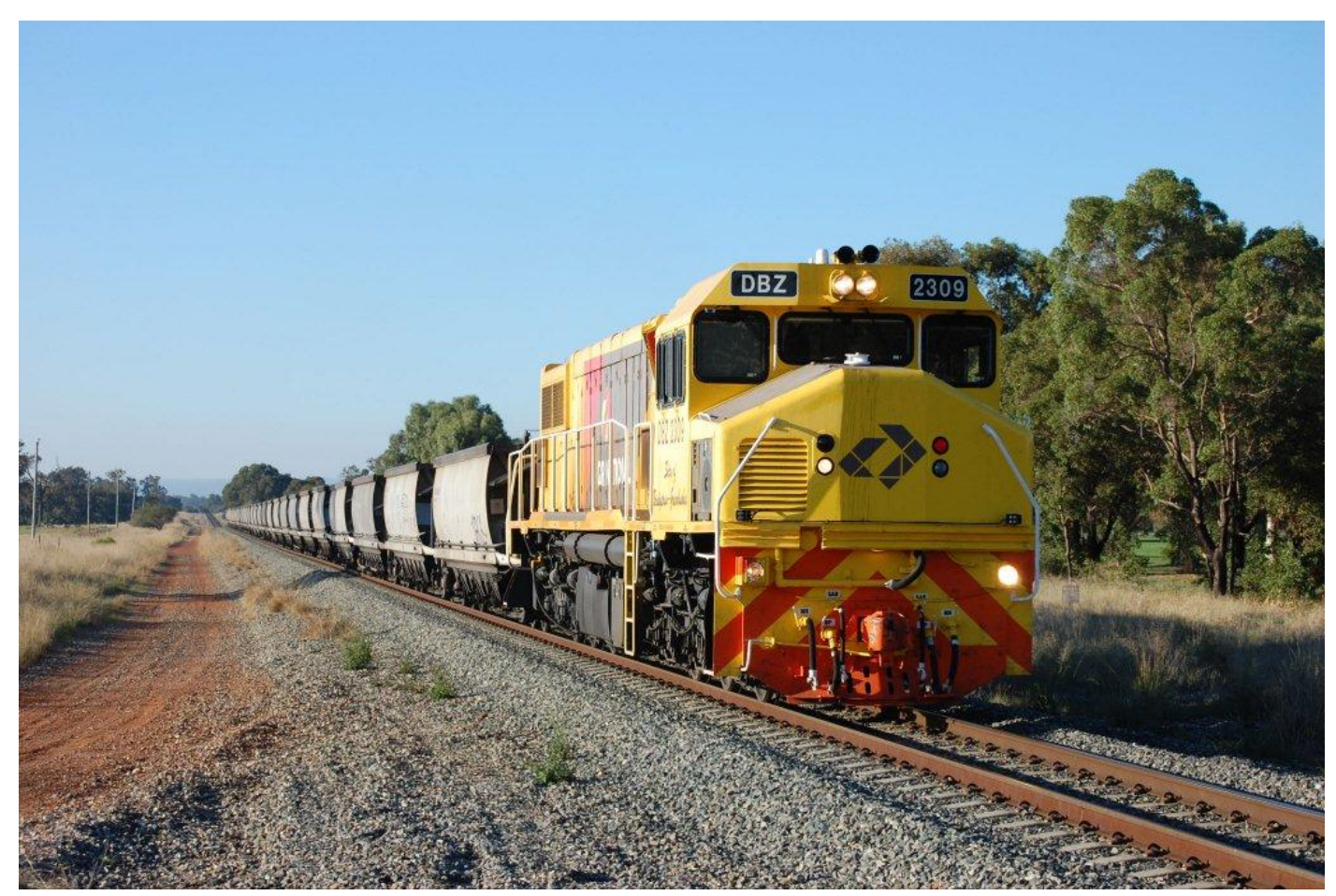
DBZ2309 on 7253 empty coal train at North Pinjarra May 12th.