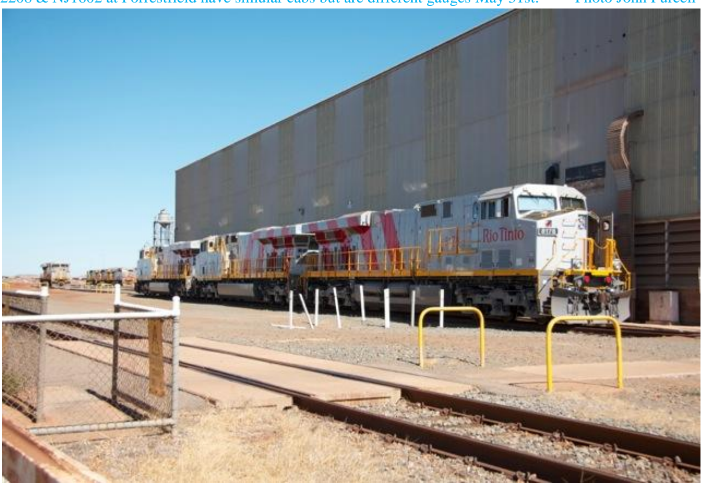
Latest ES44DCi's #8178, 8180 & 8179 at 7 Mile Dampier May 30th.