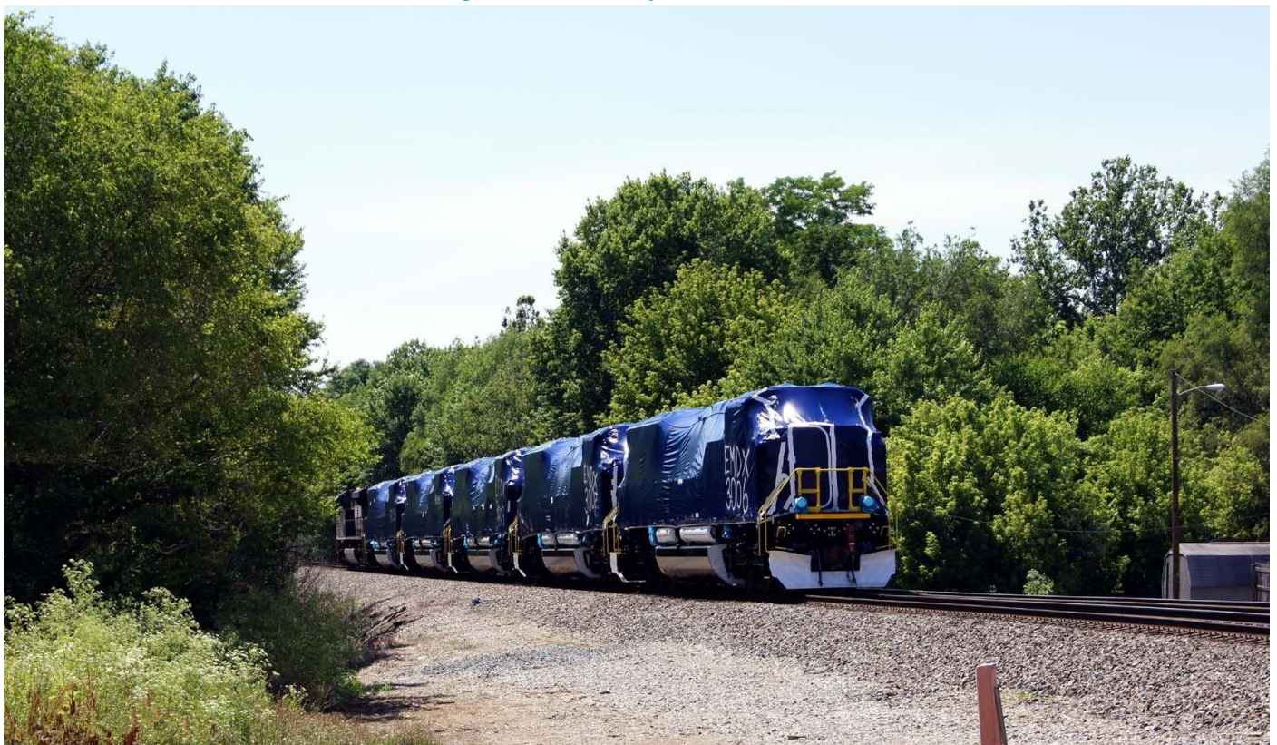
Five tarped FMG SD70ACs at Garvin Street Muncie Indiana June 15th.