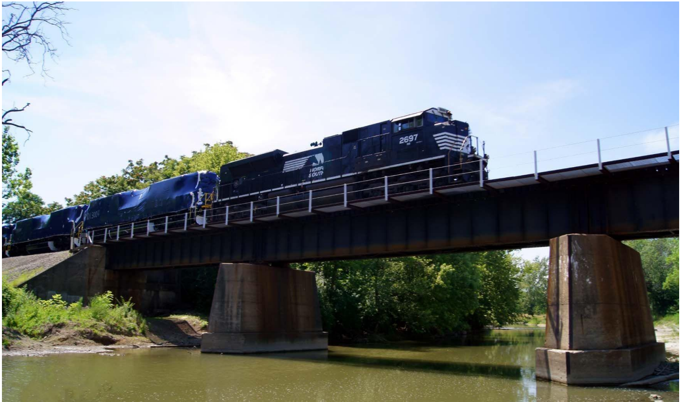
NS 2697 hauls tarped FMG SD70ACes over Bathgate Bridge Muncie on June 15th.