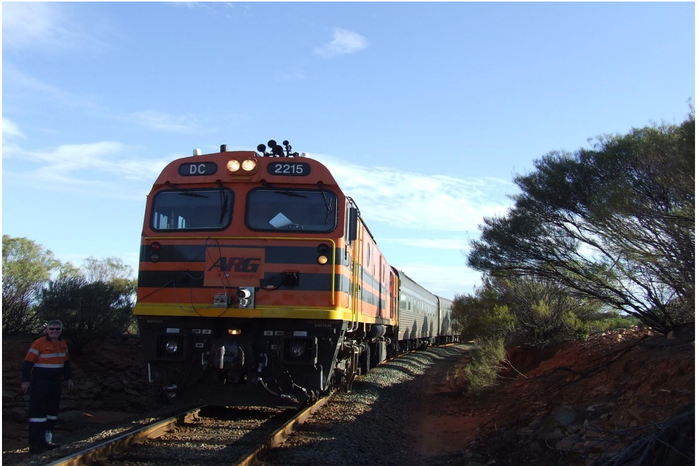
DC2215 on 3C12 AK car inspection train at Redmine Kambalda June 19th.