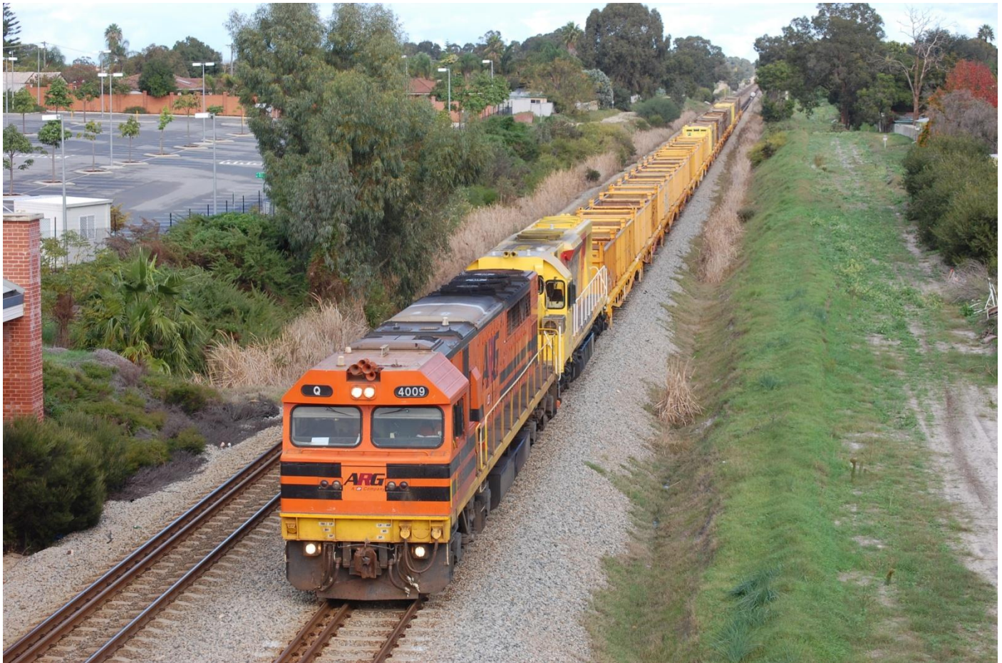
Q4009 & LZ3106 on 1175 empty salt train at Thornlie on June 17th.

Watco has commenced regular narrow gauge operations in the Great Southern hauling grain off Lake Grace line into Albany. The first train 1A12 ran from Wagin to Hyden on 17th to load, ran back to Wagin as 2A11 on 18th and on to CBH Albany terminal arriving in early hours of 19th. Following unloading CBH001 & CBH002 ran 3A12 empty grain north following 3602 empty woodchip train that departed Albany at 0830 while P2509 & P2514 had earlier arrived on 3673 grain and was standing on arrival road waiting to unload. These 60 wagon Watco trains are a tight fit at CBH Albany terminal blocking truck access at eastern end of the yard during final stages of unloading.