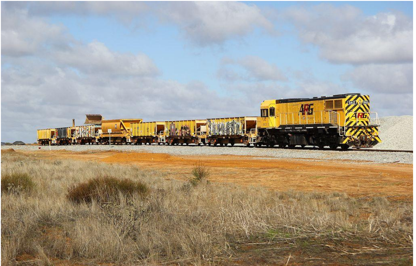
DAZ1903 loading ballast at Tardun on Perenjori line upgrading June 15th.