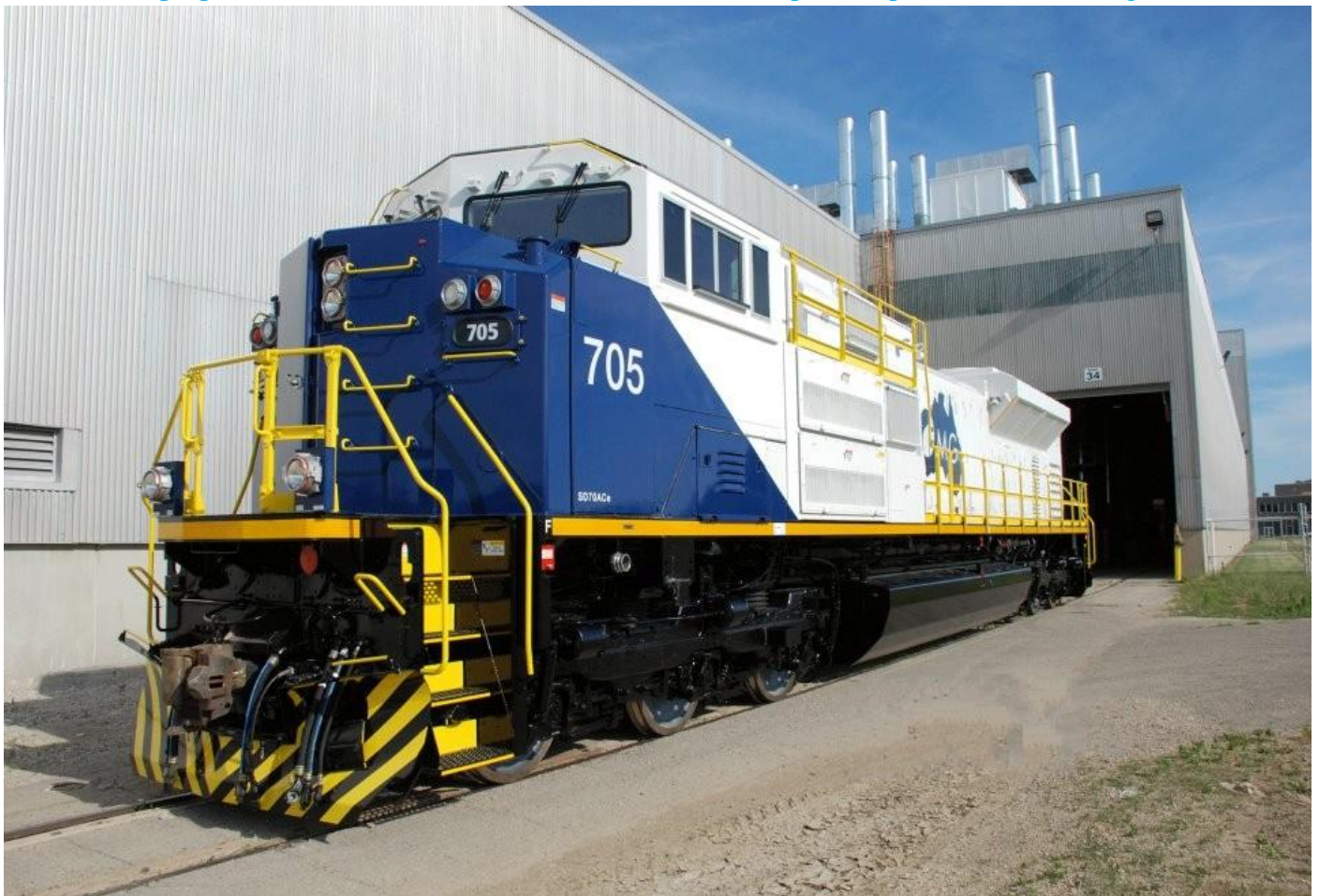
SD70ACe #705 outside EMD Muncie paint shop in June.