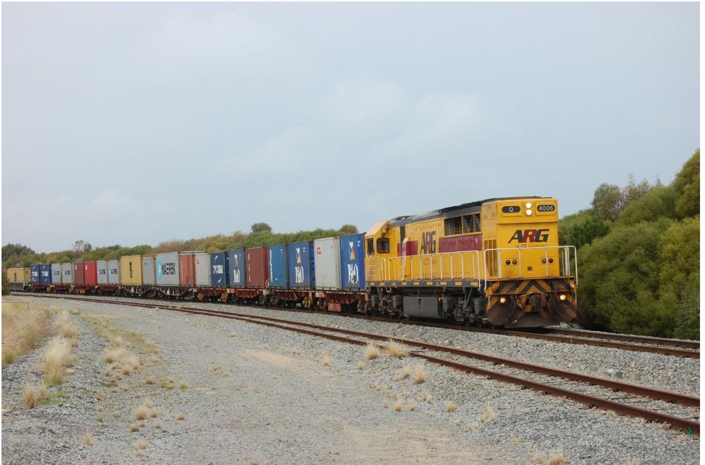
Q4006 on 7142 container train at Coogee June 16th.