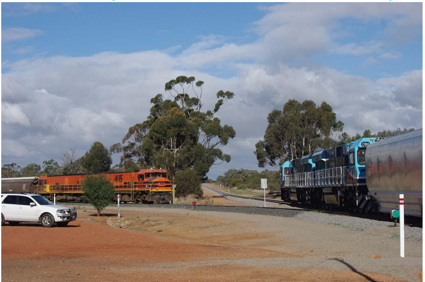
CBH001 & CBH002 on 6KO3 crosses DBZ2308 & P2507 on 6303 Brookton 15/6.