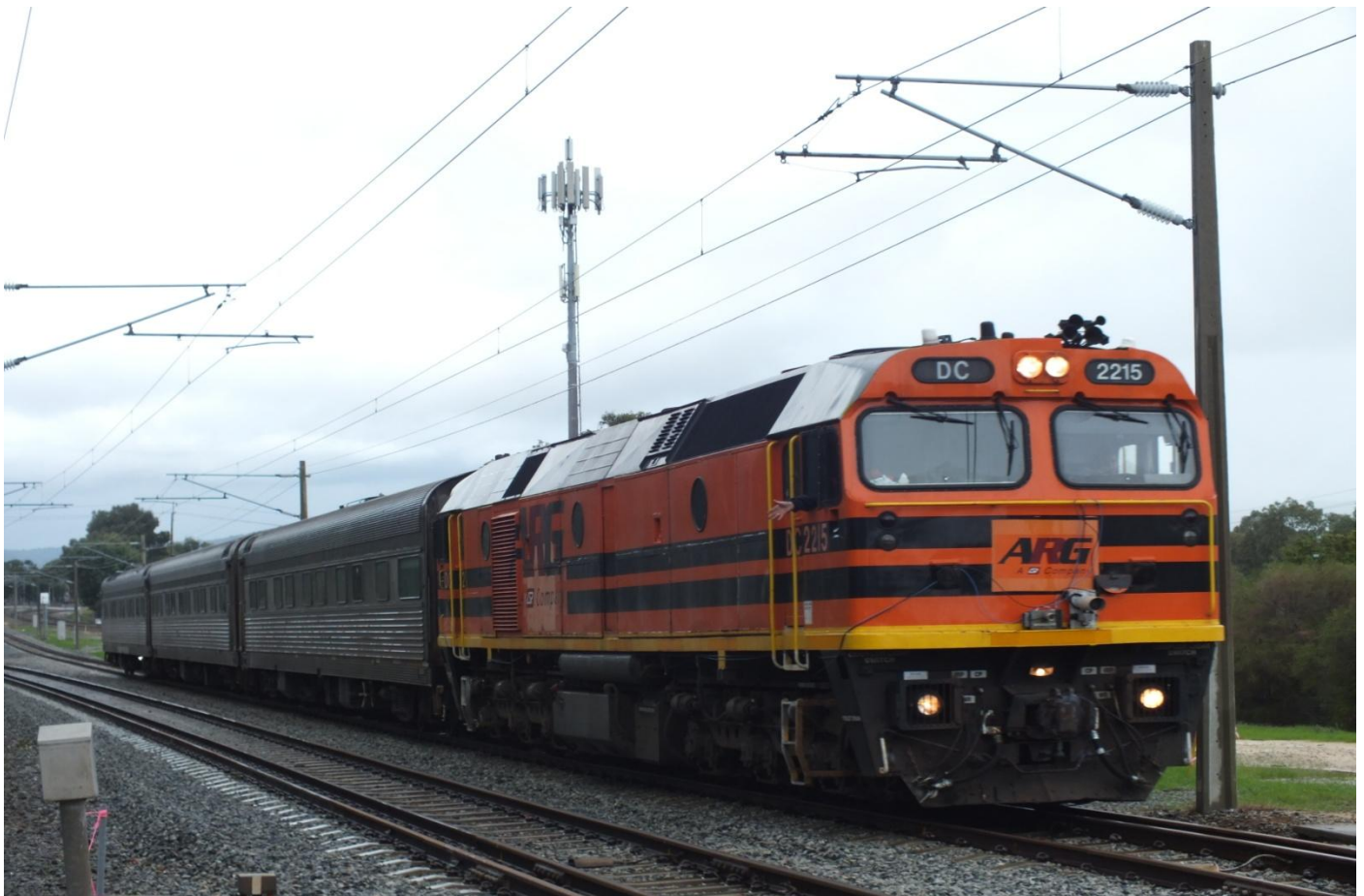
DC2215 on 7C19 AK cars on Midland suburban line at Woodbridge June 16th.