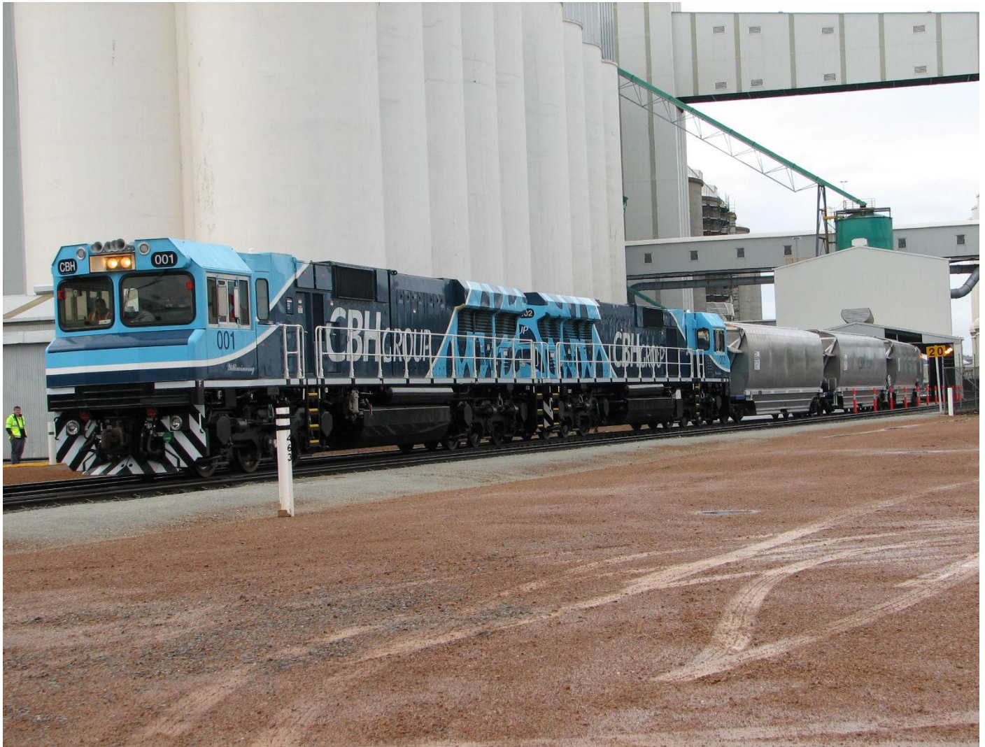
CBH001 & CBH002 on 2A11 unloading at CBH Albany terminal June 19th.