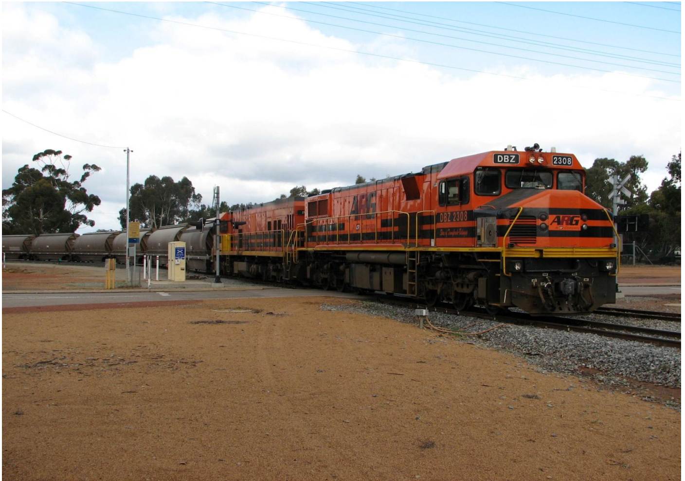
DBZ2308 & P2507 on 6303 grain train at Brookton June 15th.