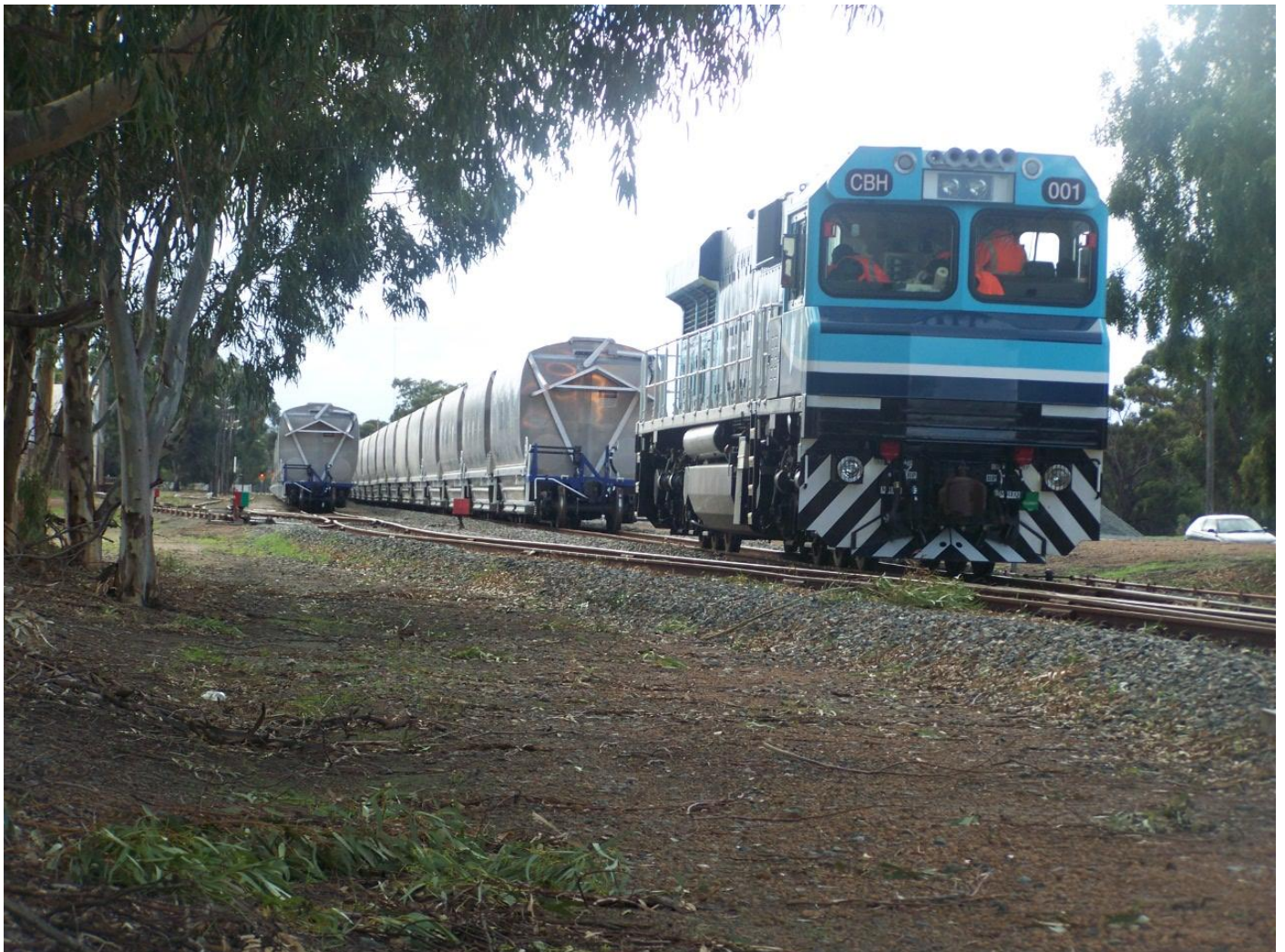
CBH001 undertaking shunting/driver tuition in Wagin yard June 16th.