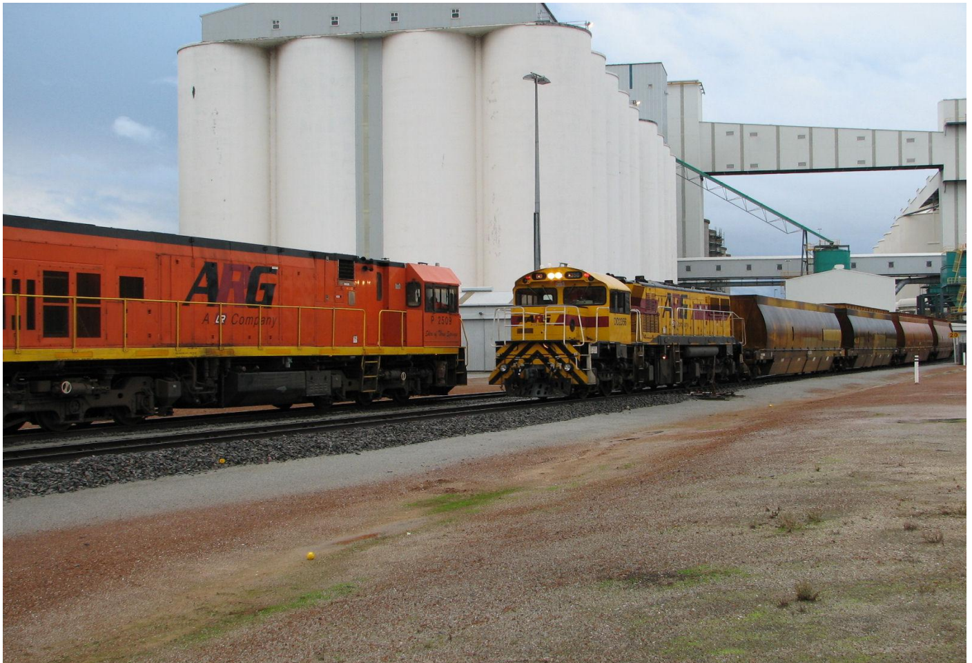
DD2358 on 3602 empty woodchips crosses P2509 on 3673 grain CBH Albany 19/06.