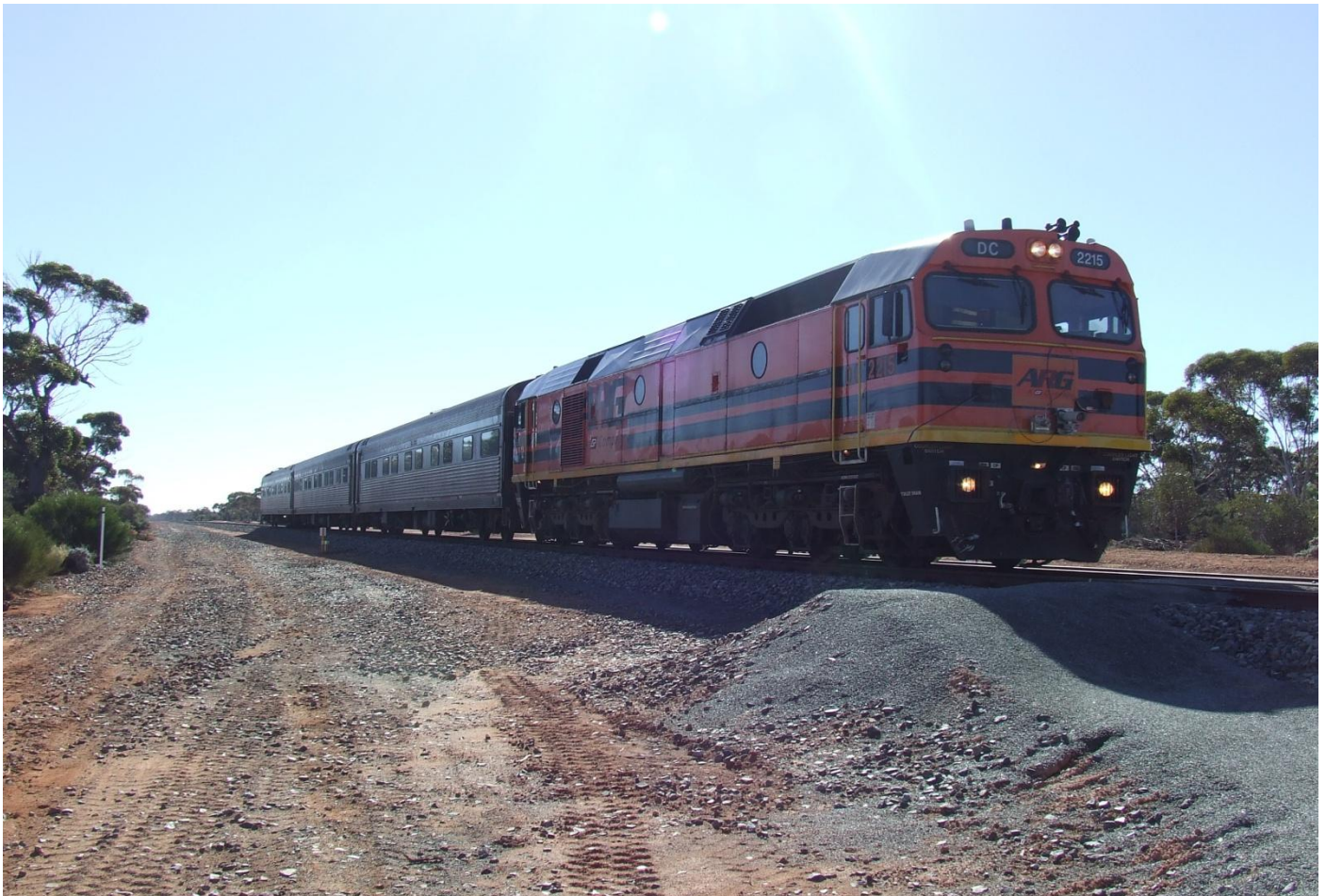
DC2215 on 2C11 AK car track recorder train at Higginsville 18th June.