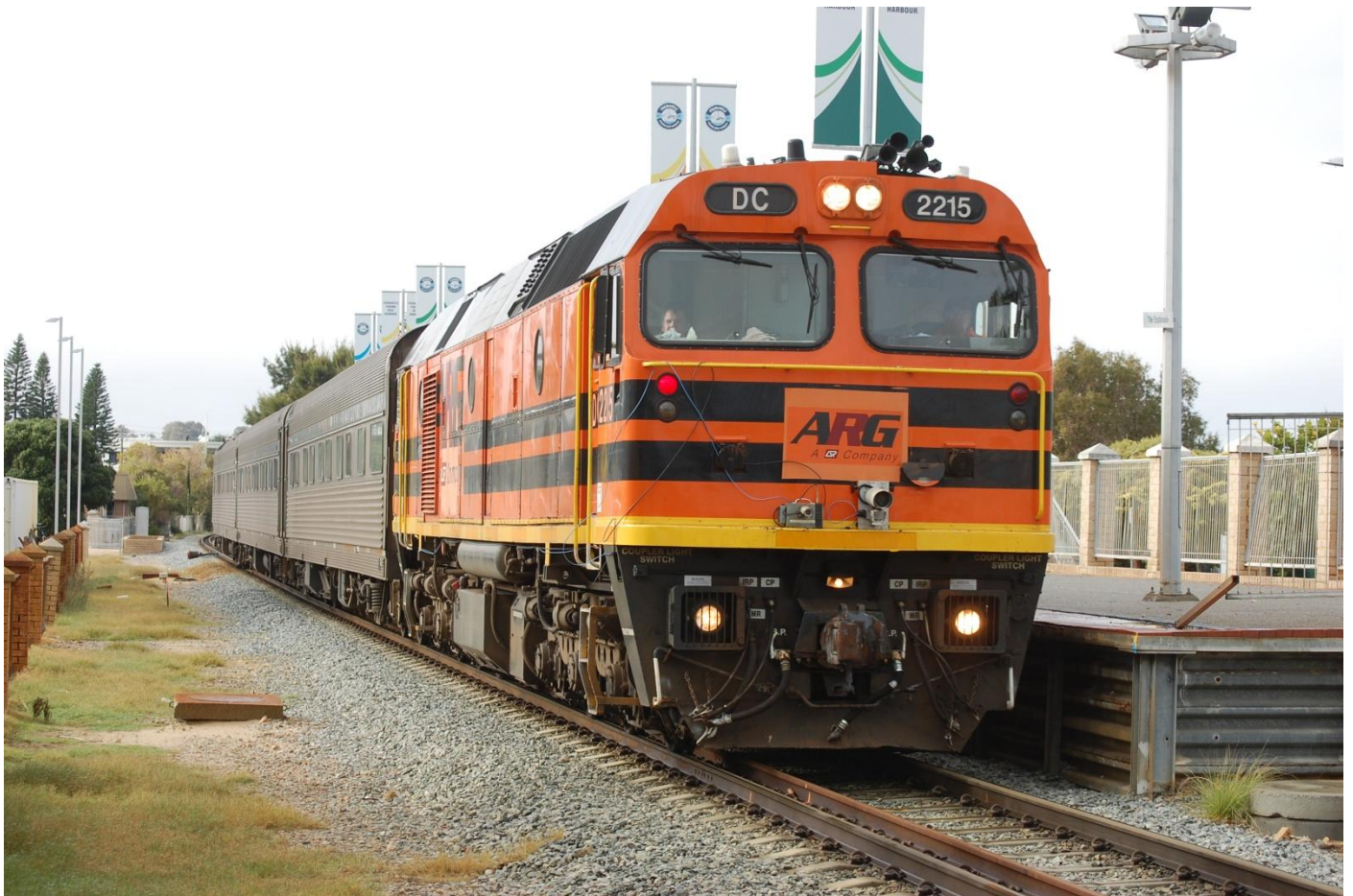
DC2215 on 7C16 AK car inspection train at a old station in Fremantle June 16th.