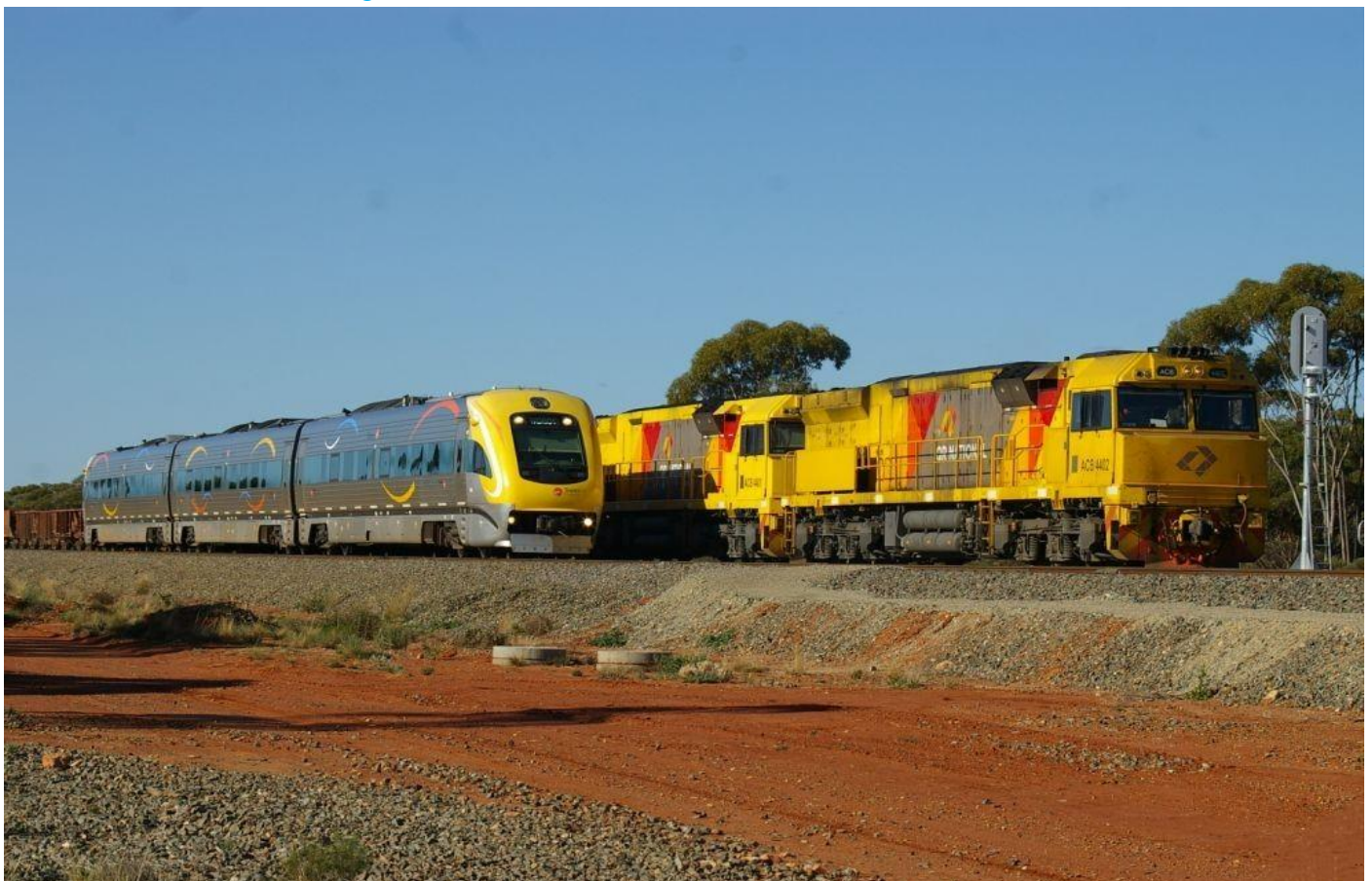
Prospector railcars passing ACB4402 & ACB4401 on 1414 empty ore Binduli 17/6.