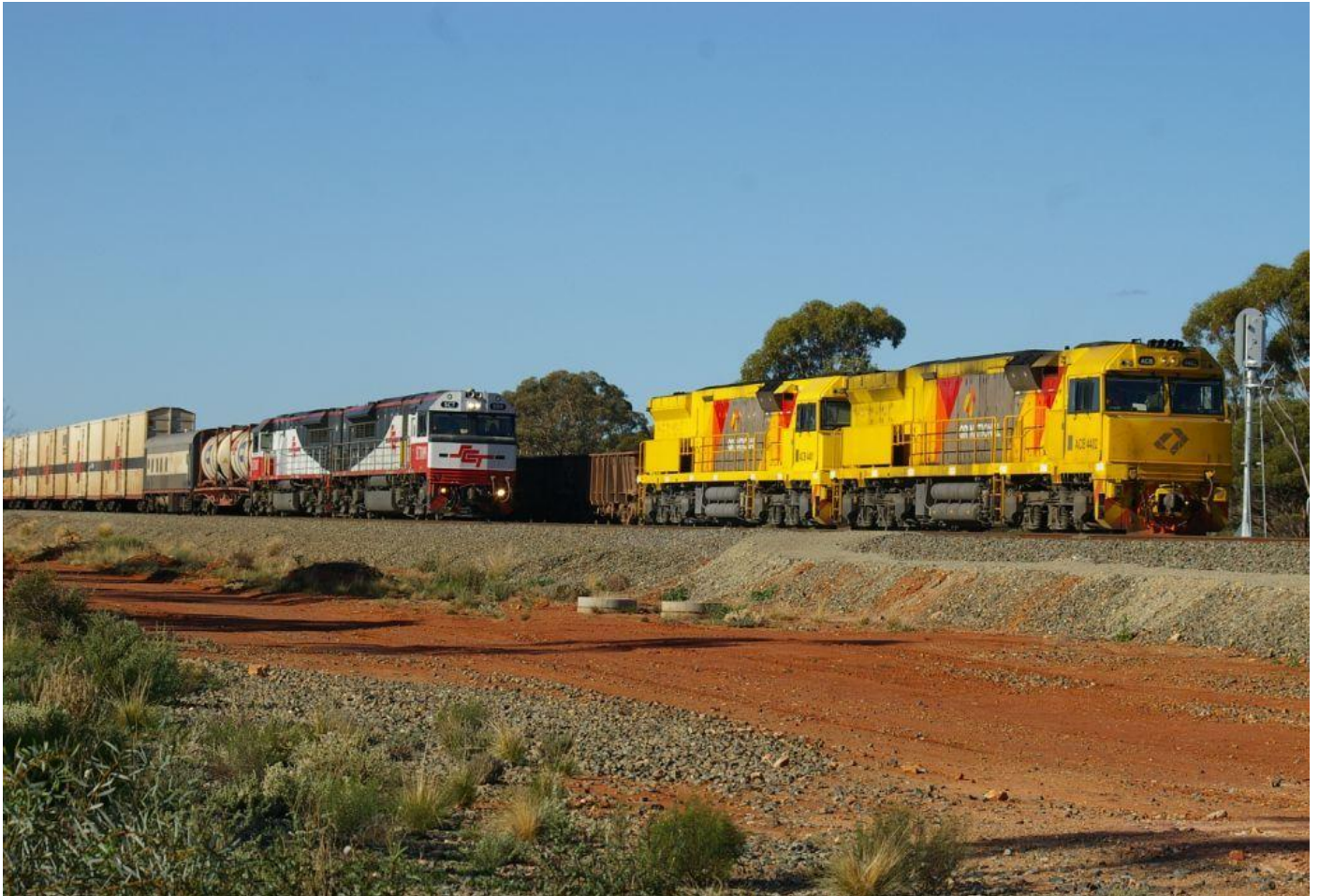
SCT009 & SCT007 bypass ACB002 & ACB001 on 1414 empty ore Binduli 17/6.