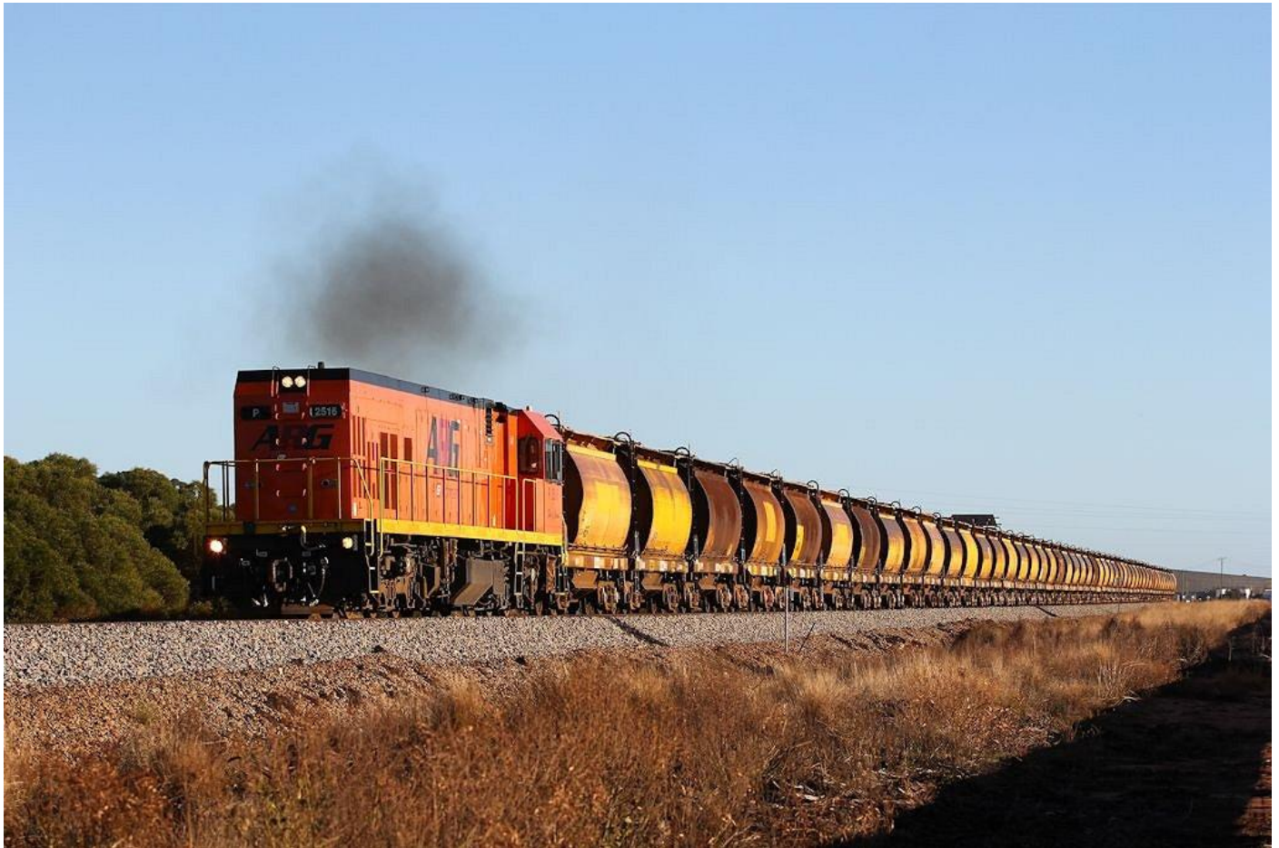
P2509 on 7702 empty mineral sands departing Narngulu June 16th.