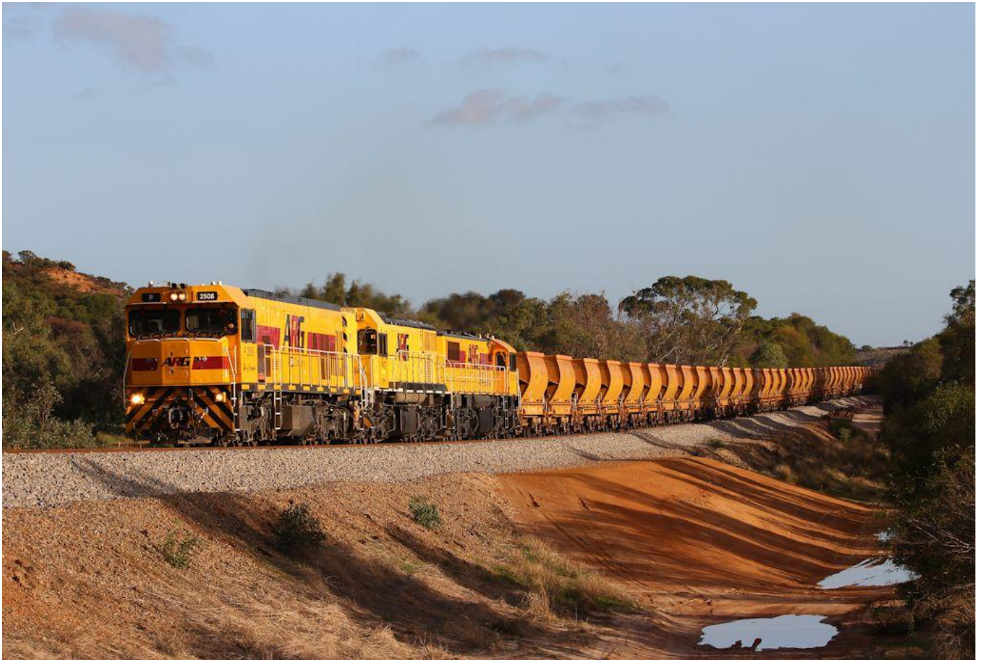
P2510, DAZ1901 & DFZ2405 haul empty Perenjori ore train at Bringo June 15th.