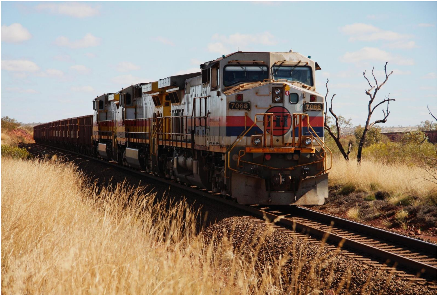
7068, 7050 & 7049 on loaded ore train at near Ibis loop on Rio Tinto line June 14th.