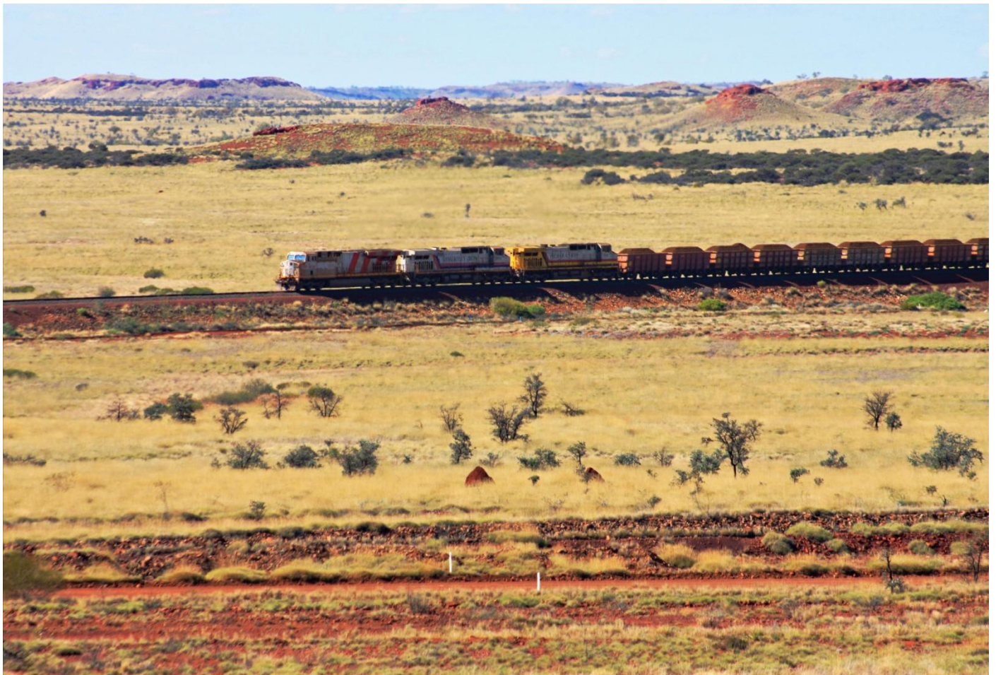
8158, 7072 & 7047 on loaded ore train near Gull passing loop June 14th.