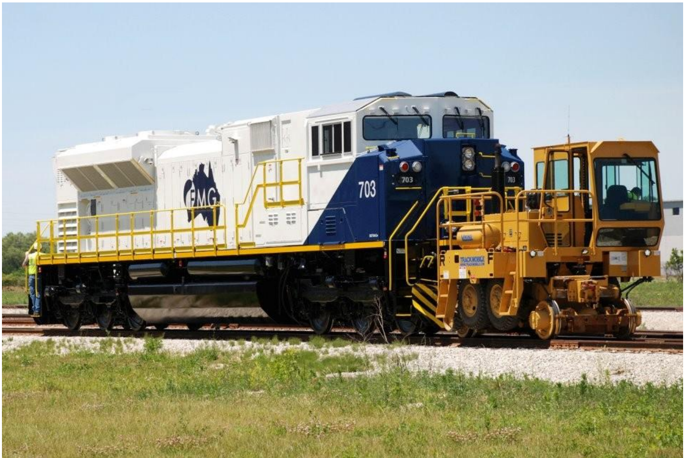
Trackmobile propels FMG SD70ACe #703 around EMD Muncie plant to position it for testing in June.