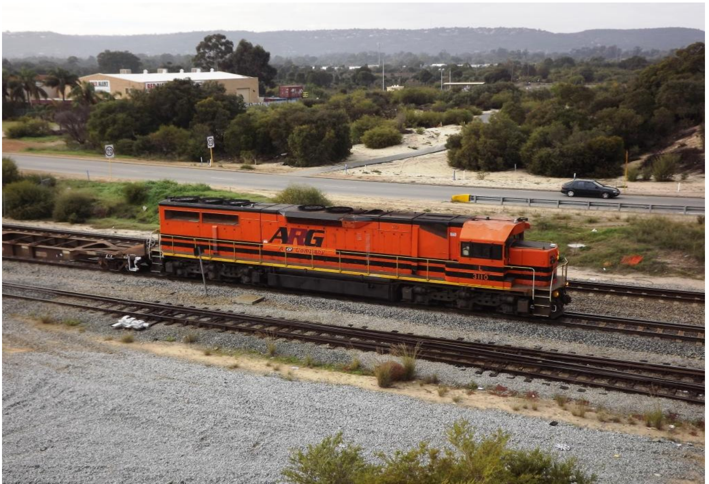
L3110 on 3025 Kwinana shunter departing Forrestfield July 17th.