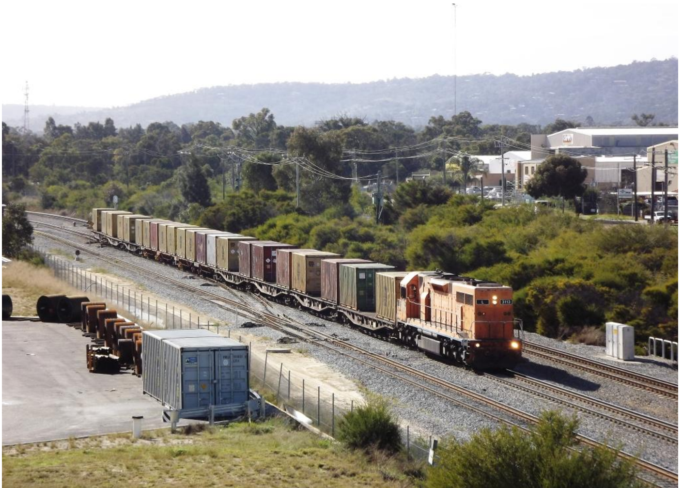
L3113 on 4196 container train departing Forreestfield July 17th.