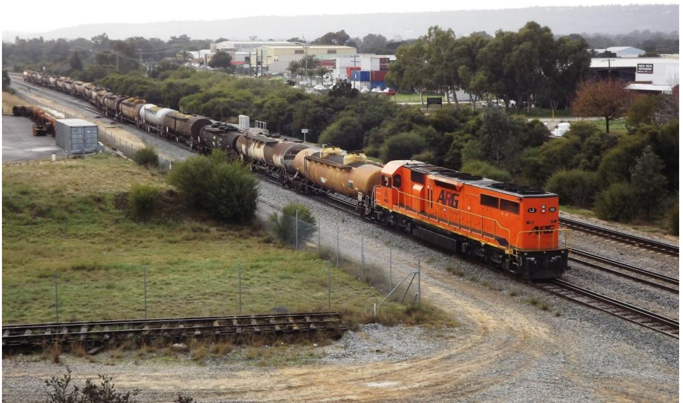
LZ3120 on 3SG1 empty tankers to BP terminal Kewdale July 17th.