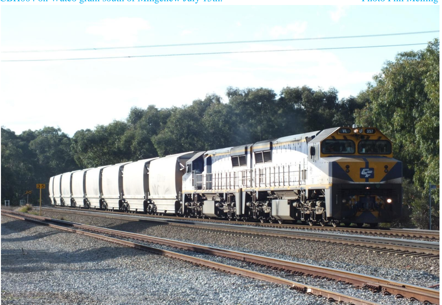
VL357 & VL361 on 1056 Watco grain train on east leg of Woodbridge triangle 22/7.