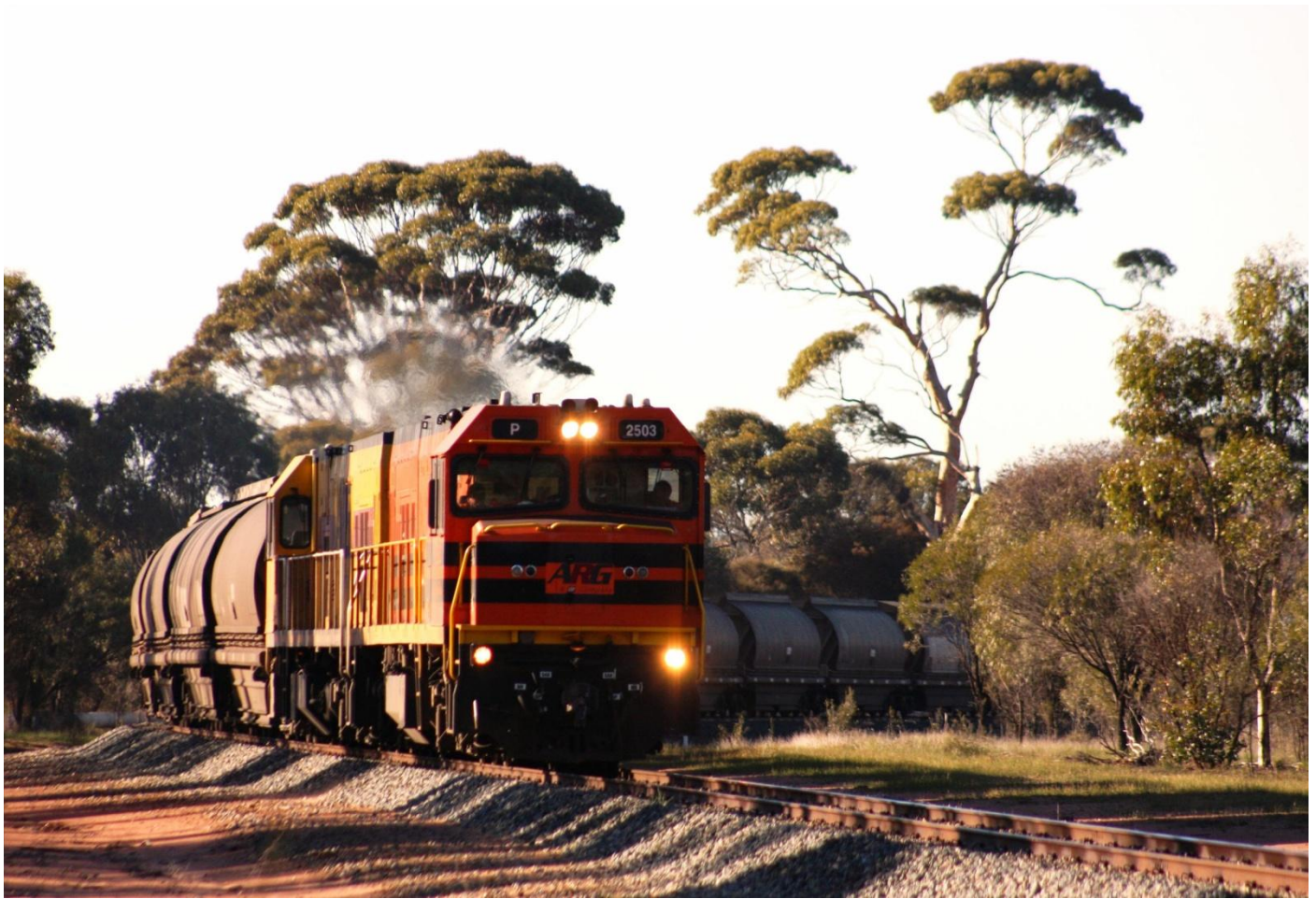
P2503 & P2511 on empty grain train at Boyerine July 27th.