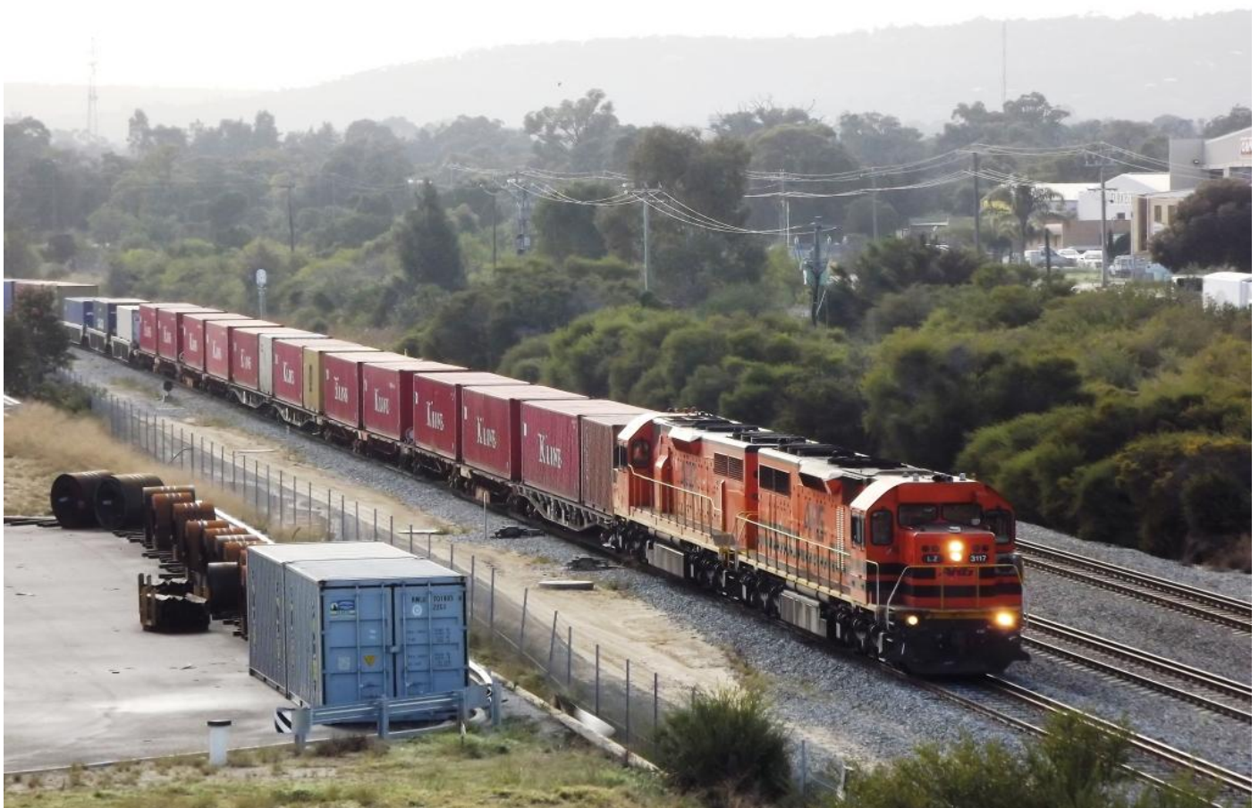
LZ3117 & LZ3114 on 4142 container train departing Forrestfield July 17th.