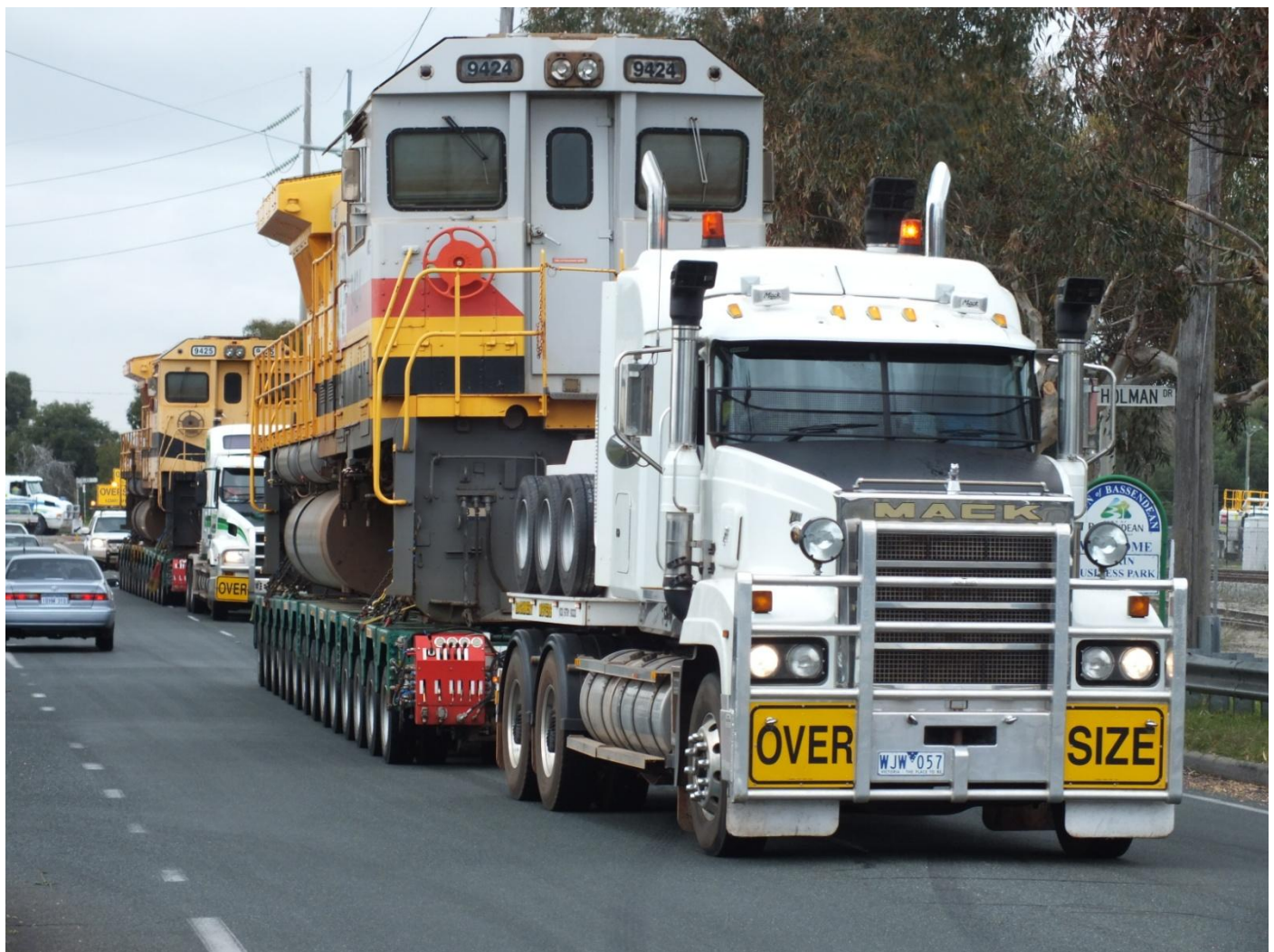
9424 and 9425 on transport floats Railway Parade Bassendean July 23rd.

All eight CFCLA former Robe River CM40-8M locomotives have now been delivered from Dampier to United Group Rail for overhaul with arrival of 9425 and 9424 on July 23rd. Overhaul of the first four units that arrived earlier in the year continues with former 9410 having been painted into CFCLA livery.