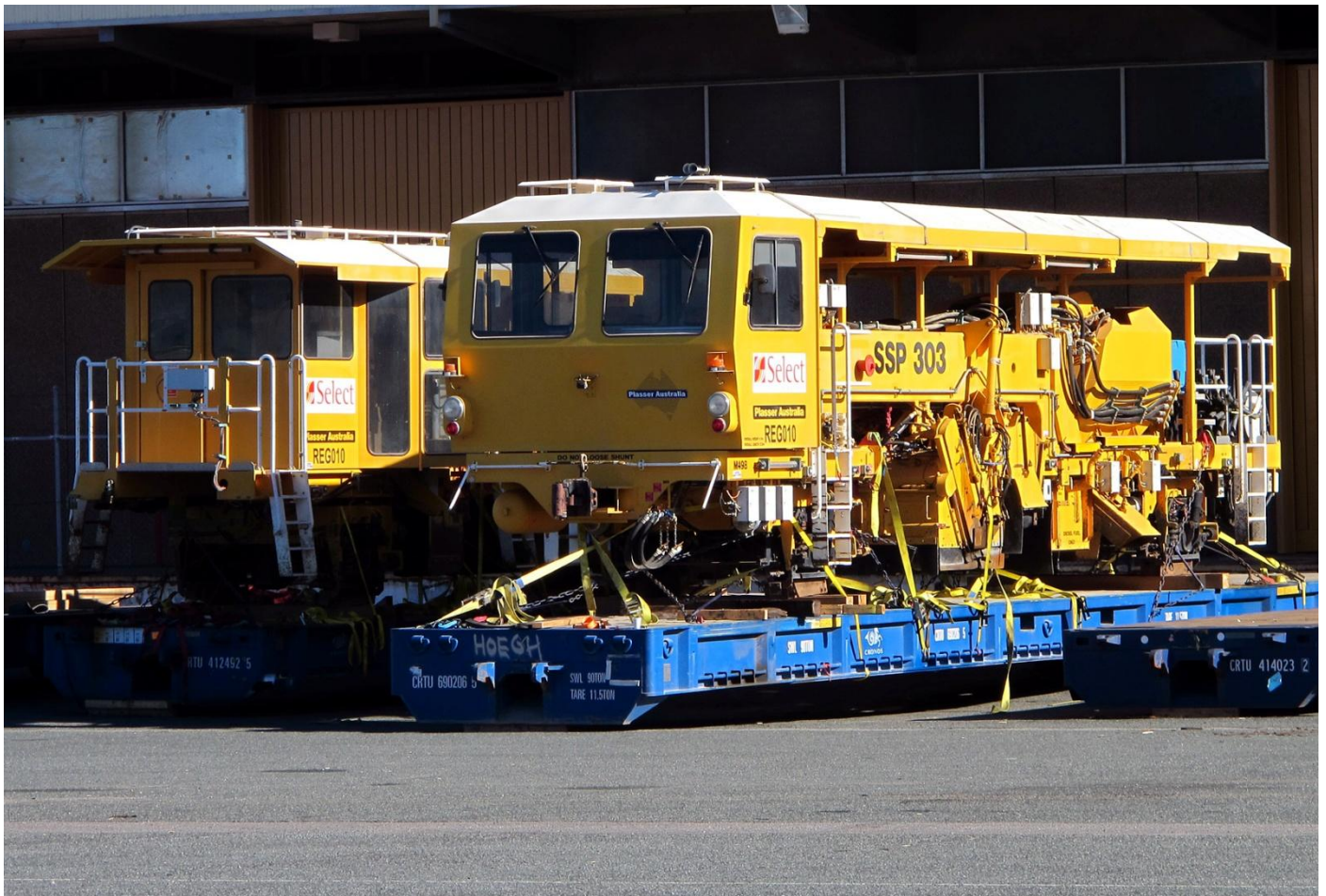
Two Plasser Australia tampers at Victoria Quay Fremantle July 26th.