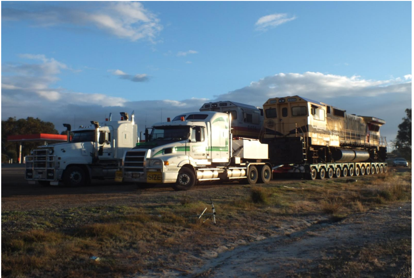
CFCLA CM40-8M 9424 and 9425 at Chittering Roadhouse July 23rd.