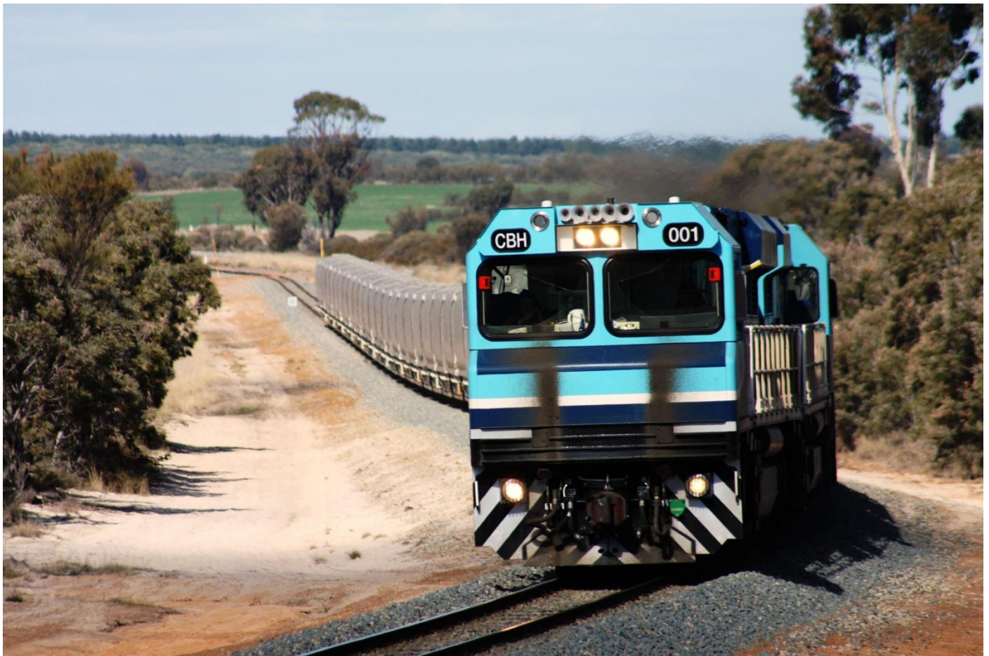
CBH001 & CBH002 on empty Watco grain train at Lime Lake July 27th.