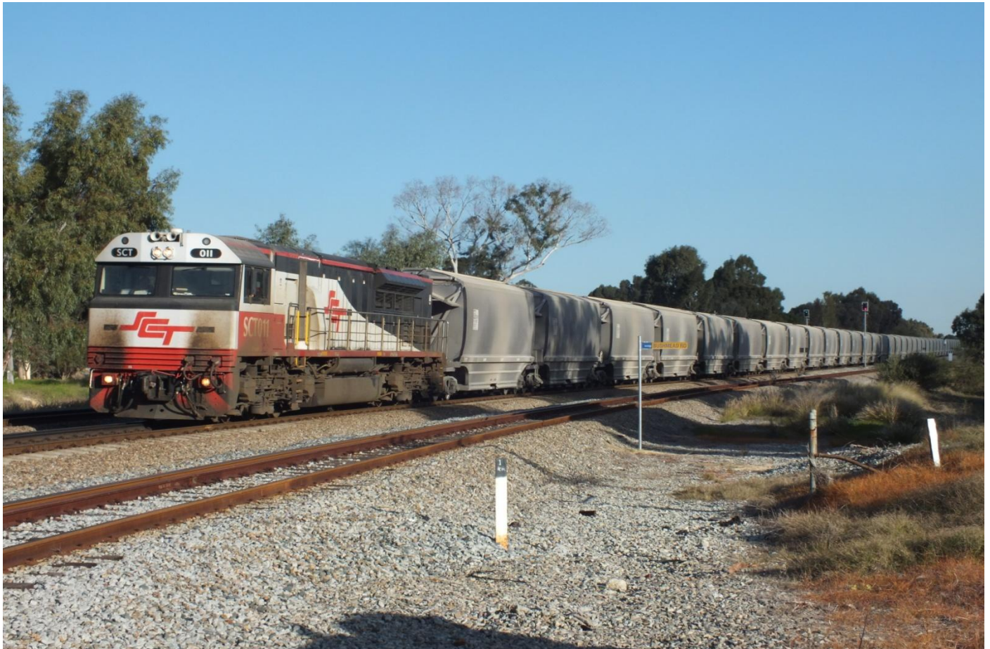
SCT011 on 7S55 empty Watco grain at Woodbridge July 21st.