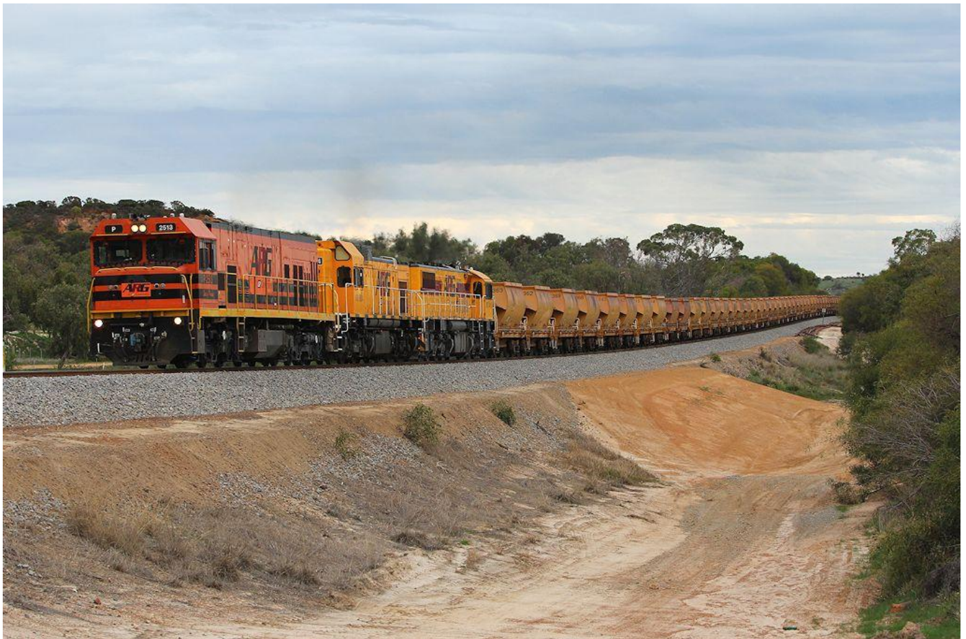
P2513, AB1504 & DFZ2405 on 7720 empty Perenjori ore train at Bringo July 21st.