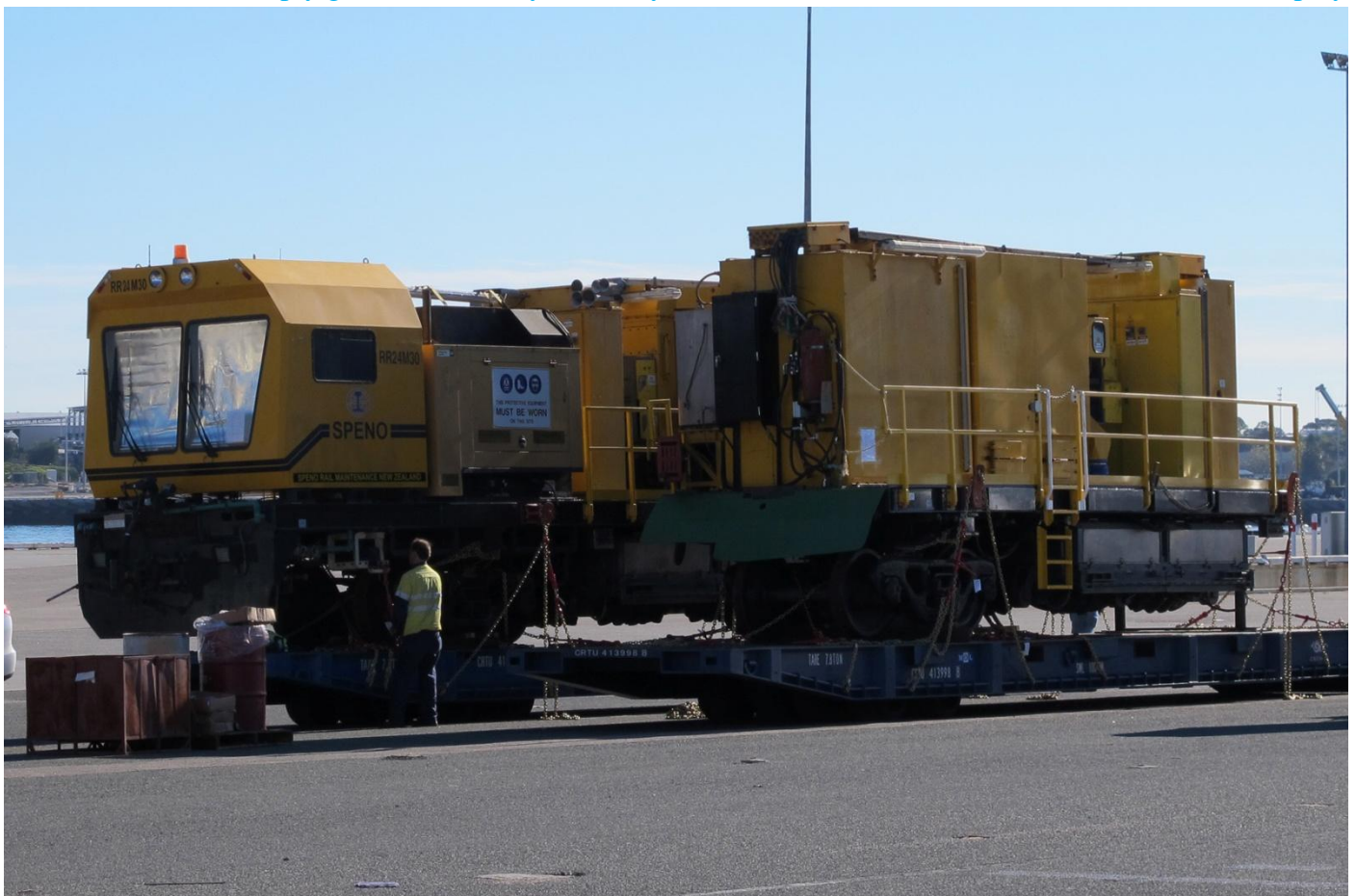
RR24M30 Speno Rail Grinder on Victoria Quay Fremantle July 26th.