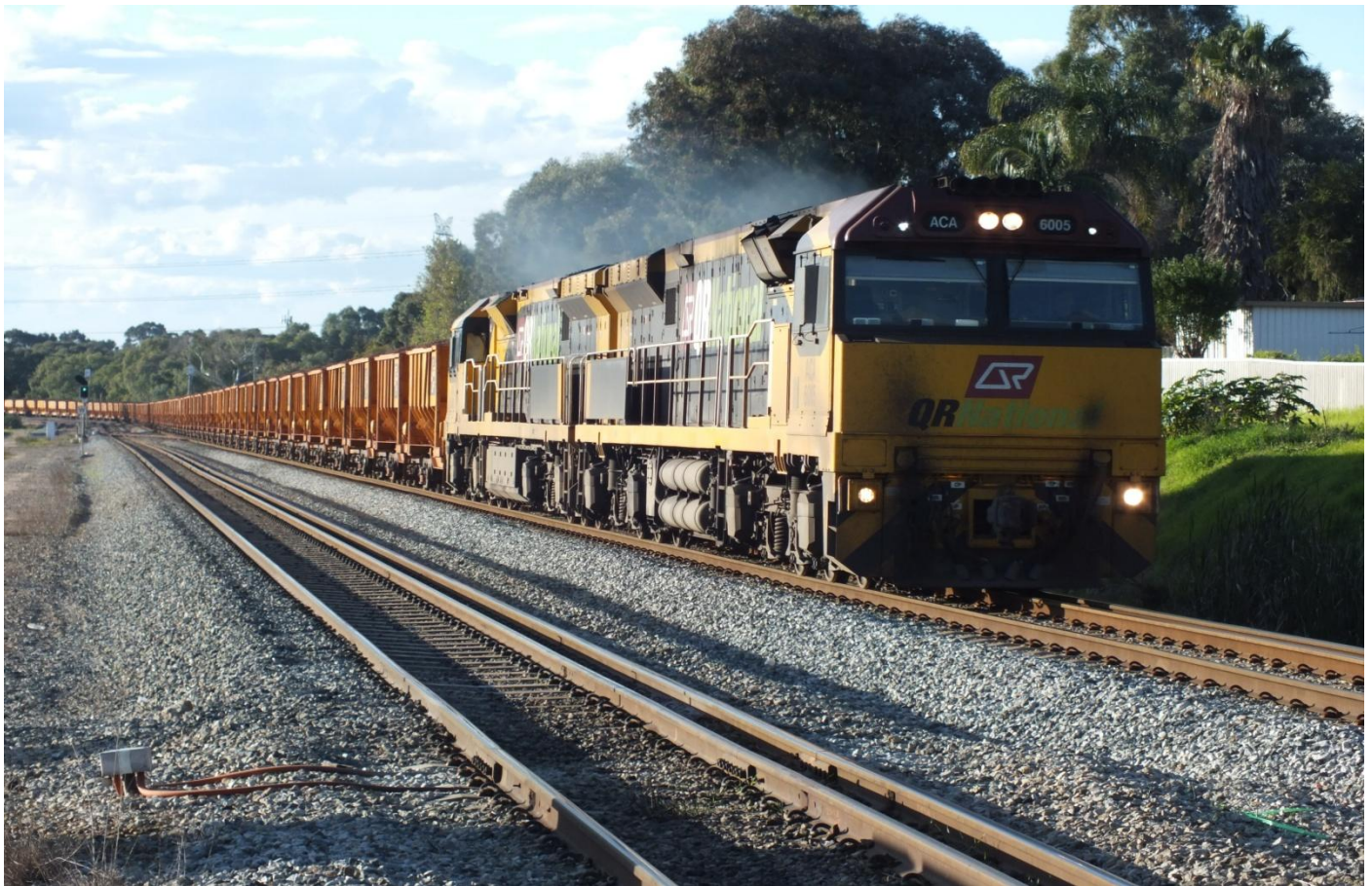
ACA6005 & ACA6002 on 1030 ore train at Hazelmere July 22nd.