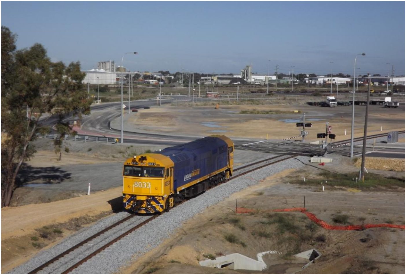
8033 runs light engine from Sadleir Logistics Kewdale July 17th.