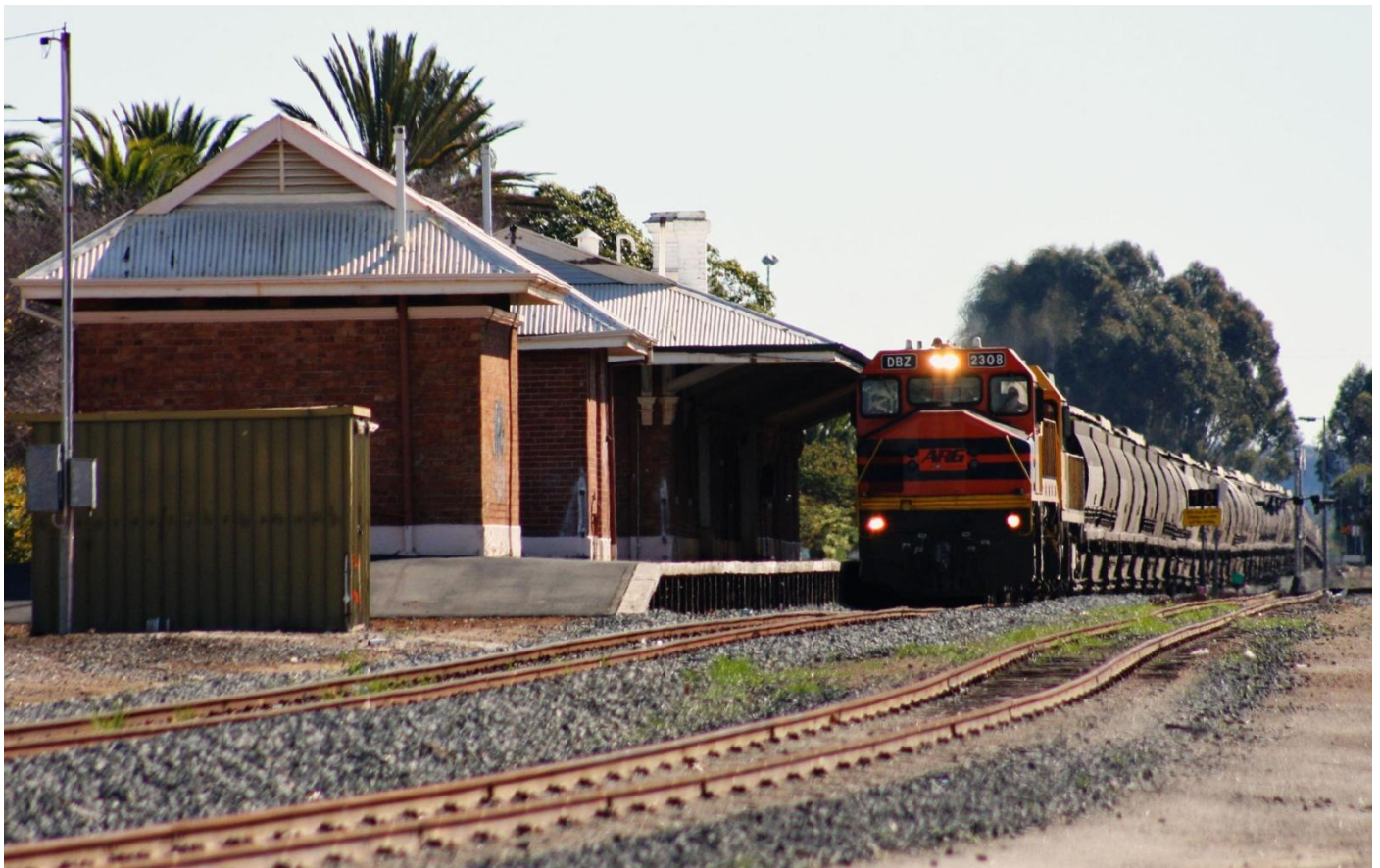
DBZ2308 & P2511 on grain passing Katanning station July 20th.