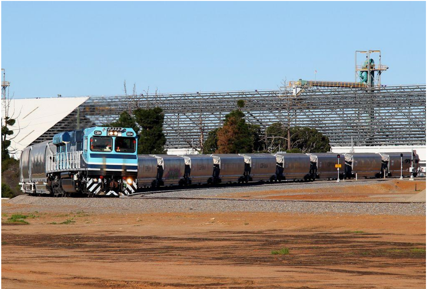
CBH004 on Watco grain arriving Mingenew while grain bin gets extensive work 15/7.