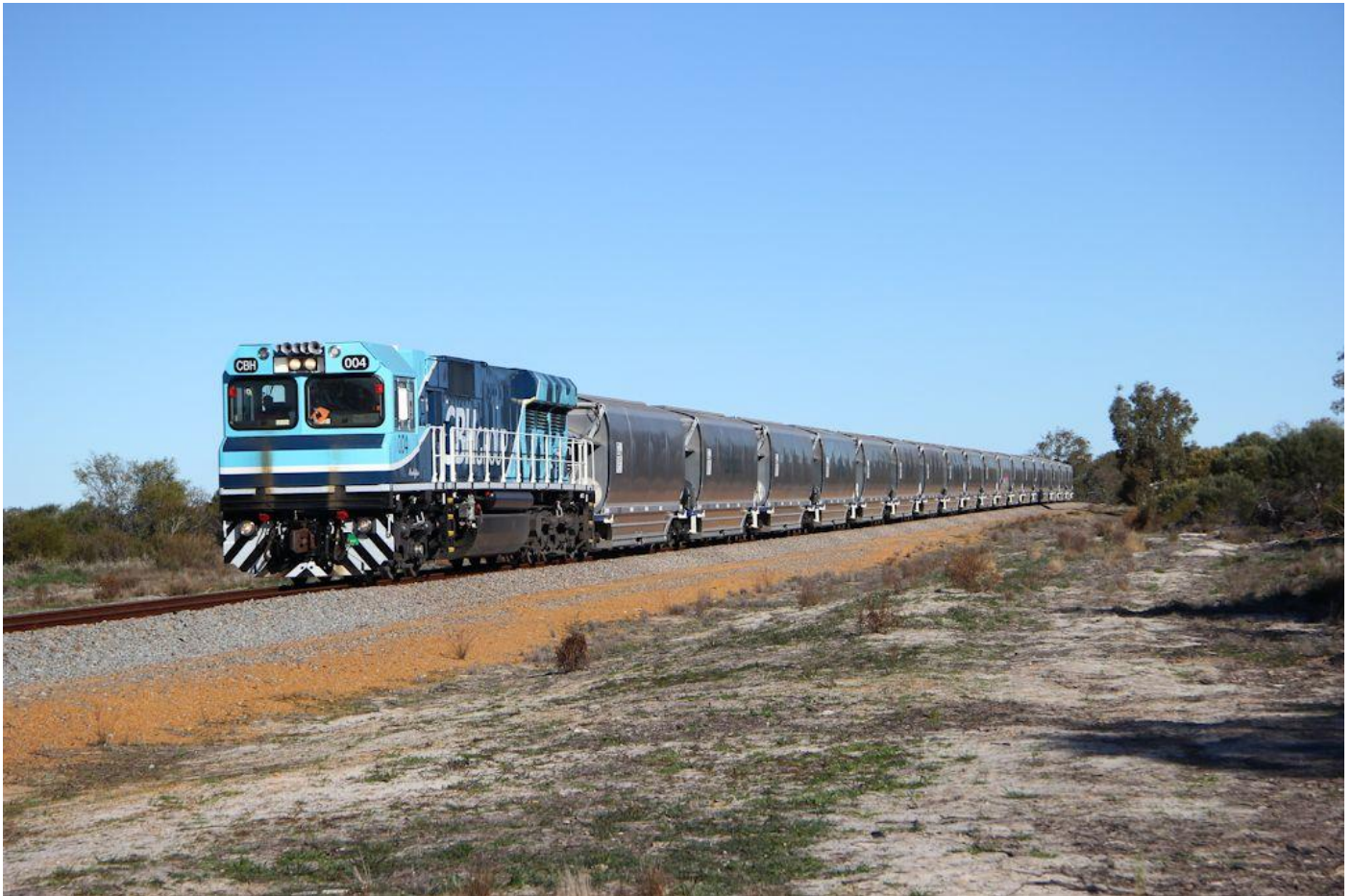
CBH004 on Watco grain south of Mingenew July 15th.