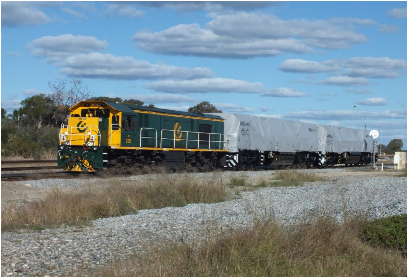
ZB2120 propels WAMX2707 & WAMX2706 to Gemco Forrestfield July 24th.