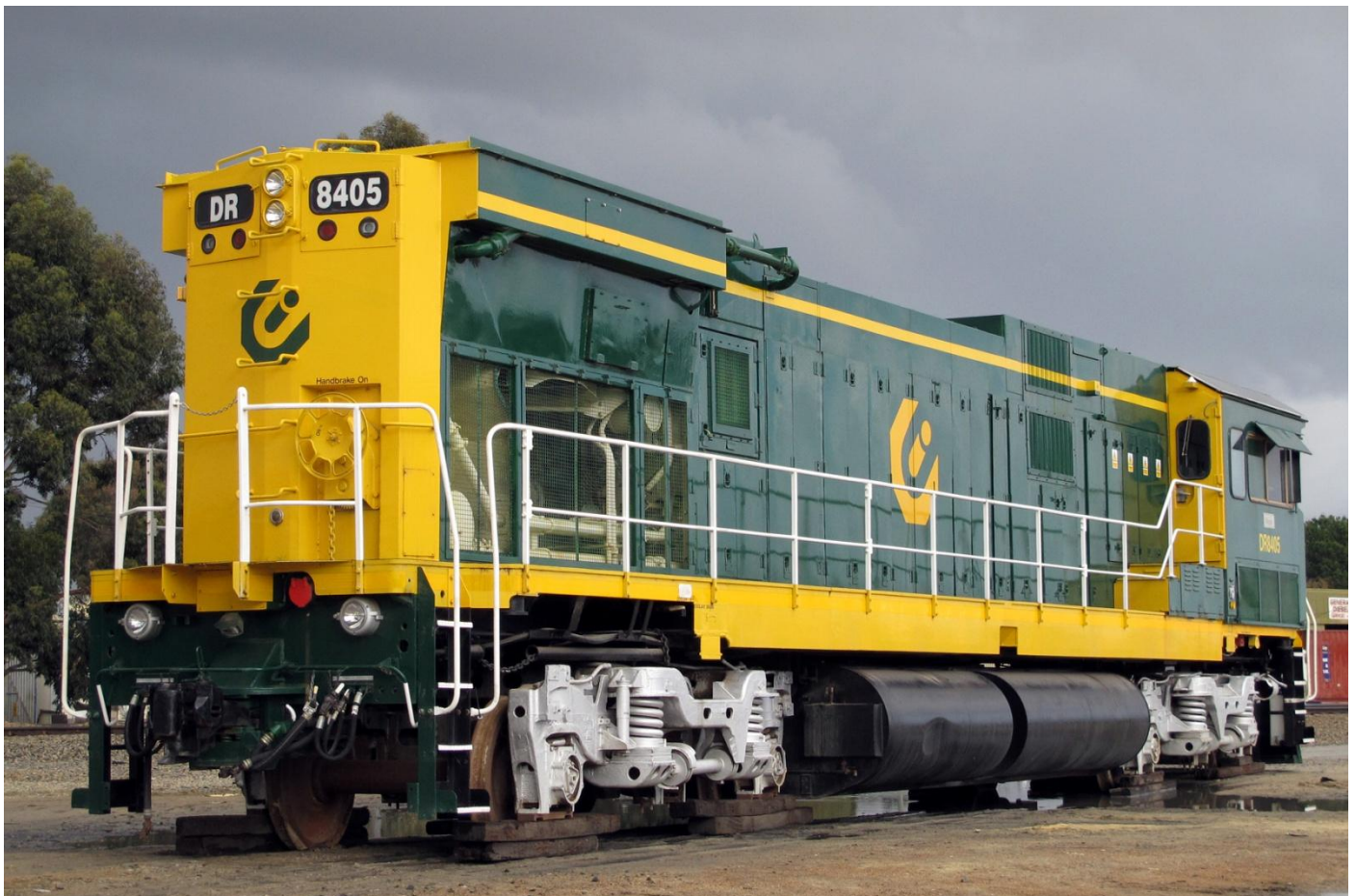
DR8405 B end at stored at Bellevue August 1st.