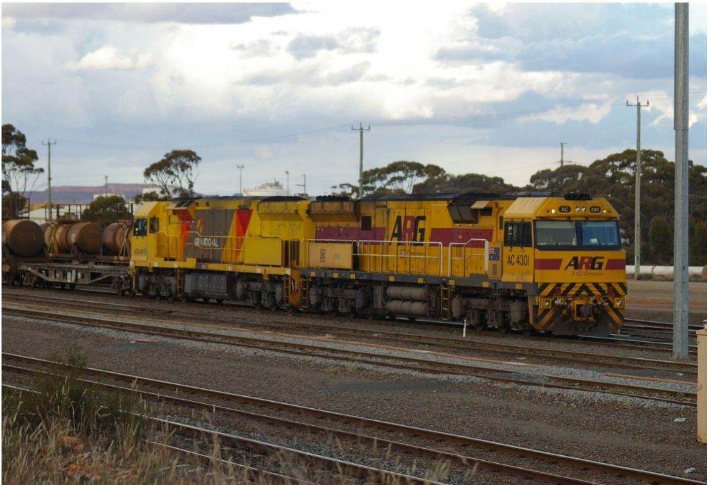
AC4301 & ACB4401 on 4426 in West Kalgoorlie yard July 23rd.