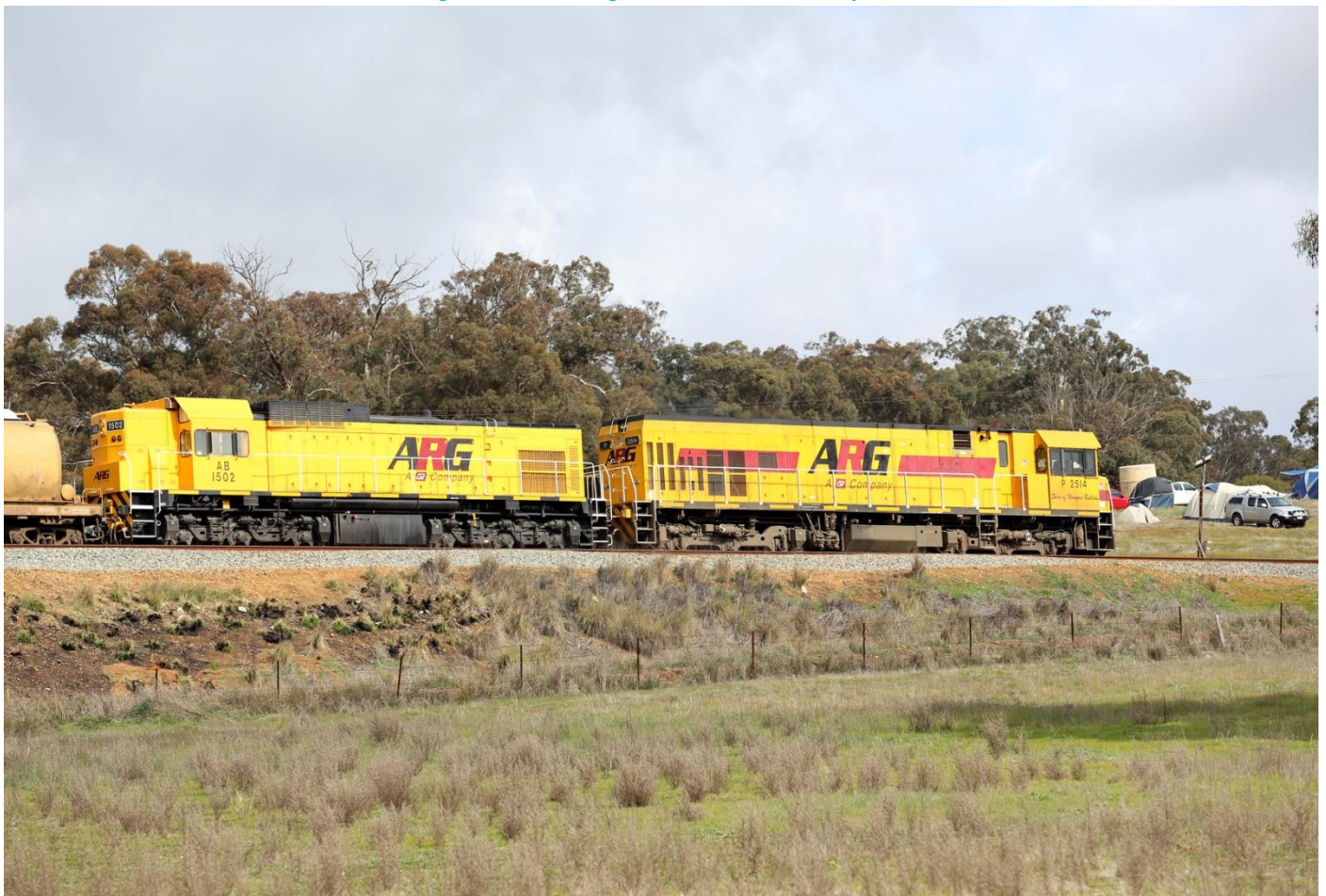
P2514 & AB1502 on 7312 grain at Cobblers Pool passing Avon Decent campsite 4/8.