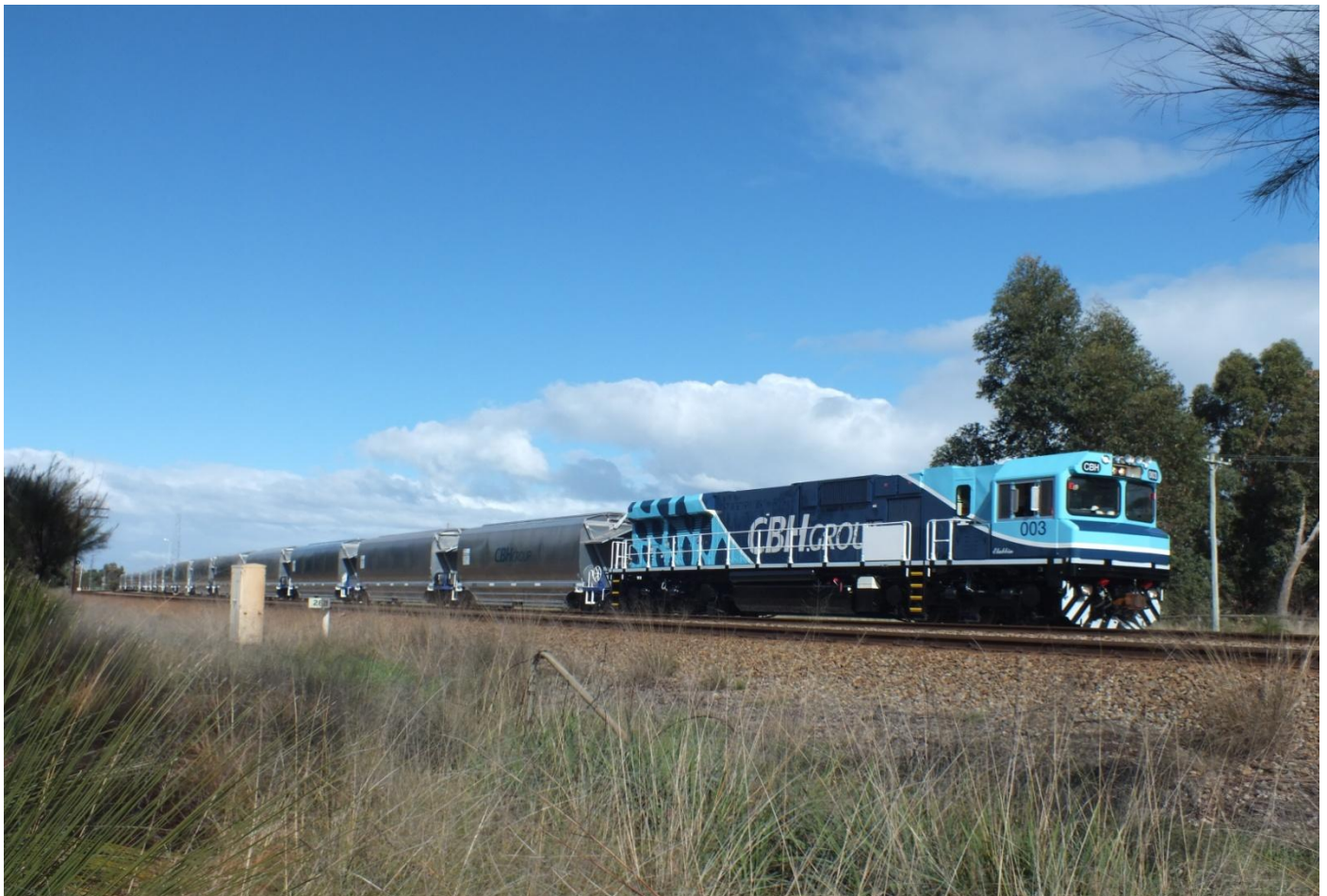
CBH003 on 5G65 crossing over onto Midland Railway at Millendon August 2nd.