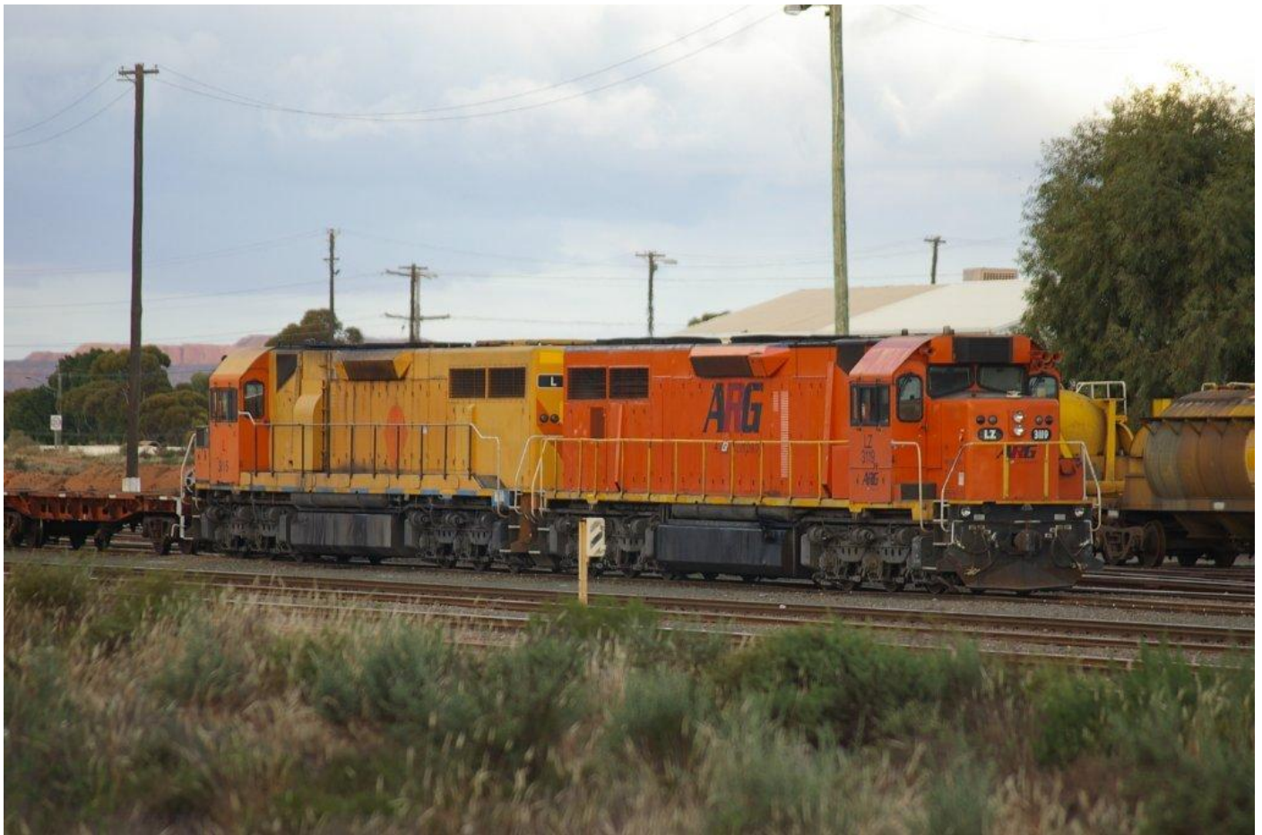
LZ3119 & LZ3116 on 2443 Esperance fuel train at West Kalgoorlie July 23rd.