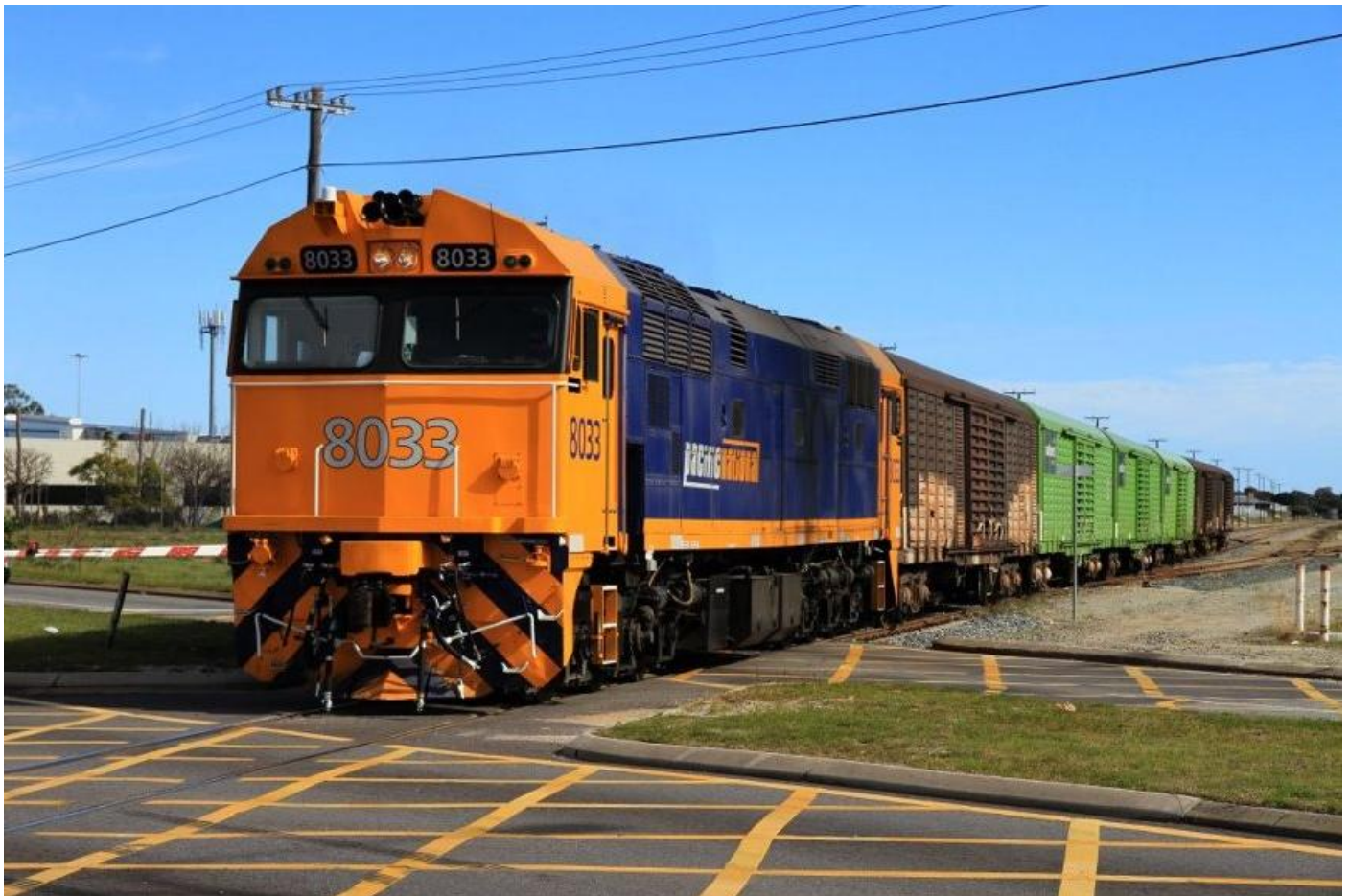
8033 on 1P53 transfer ex Sadleir Logistics crossing Kewdale Road July 29th.