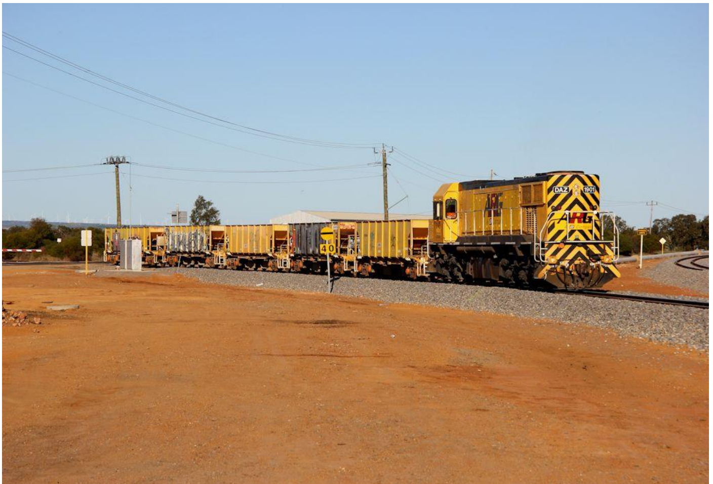
DAZ1901 on empty ballast train off the Mullewa line at Narngulu July 28th.