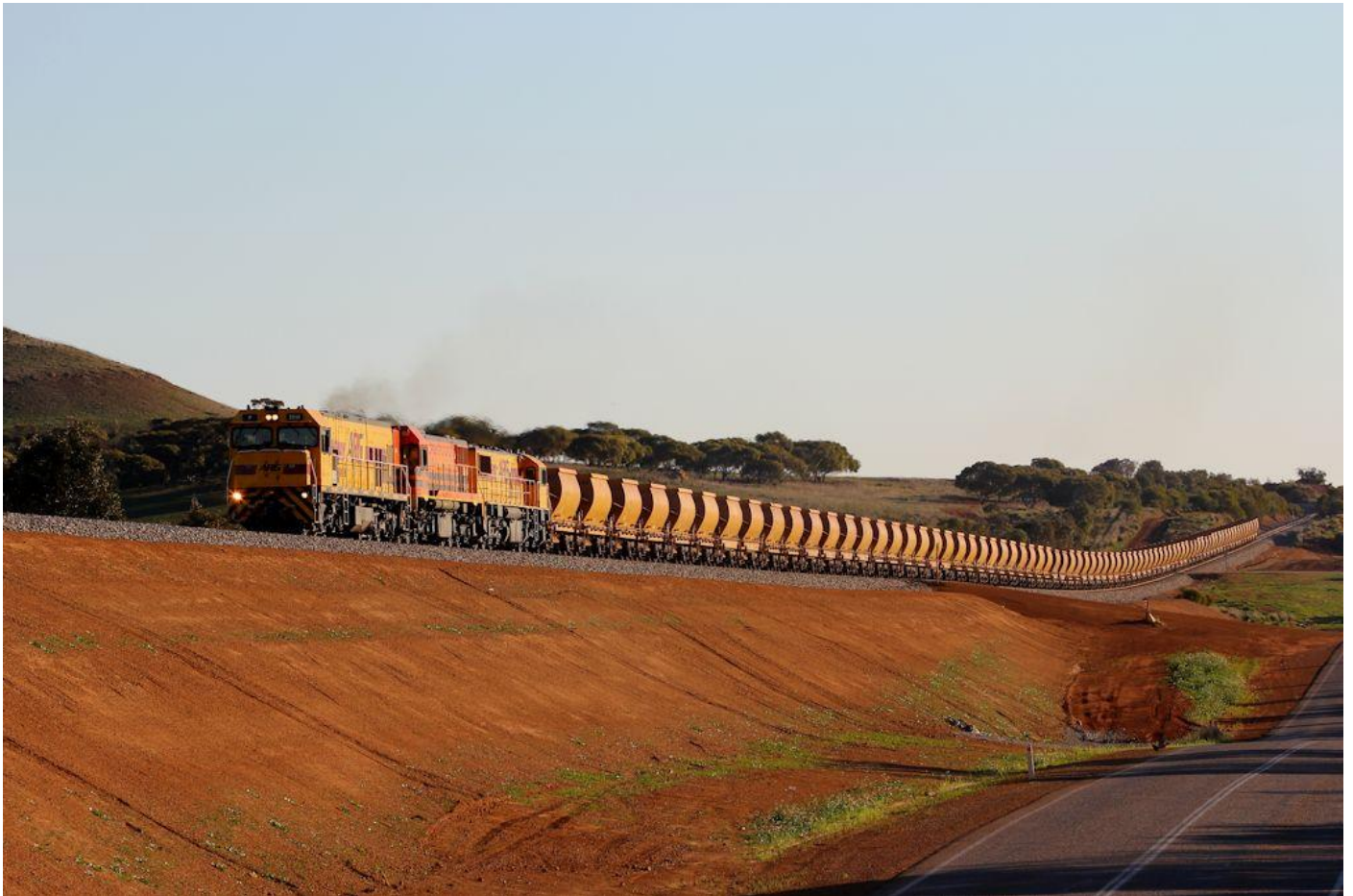
P2510, P2505 & DFZ2405 on 7720 empty ore train just west of Bringo July 28th.