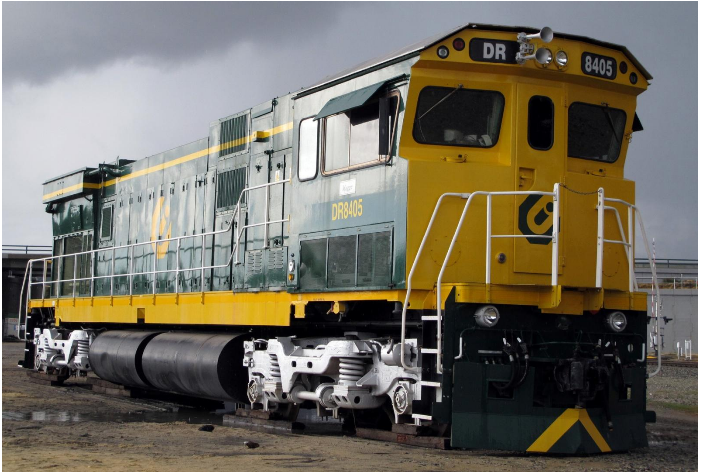
DR8405 stored at Bellevue August 1st note no centre axle.