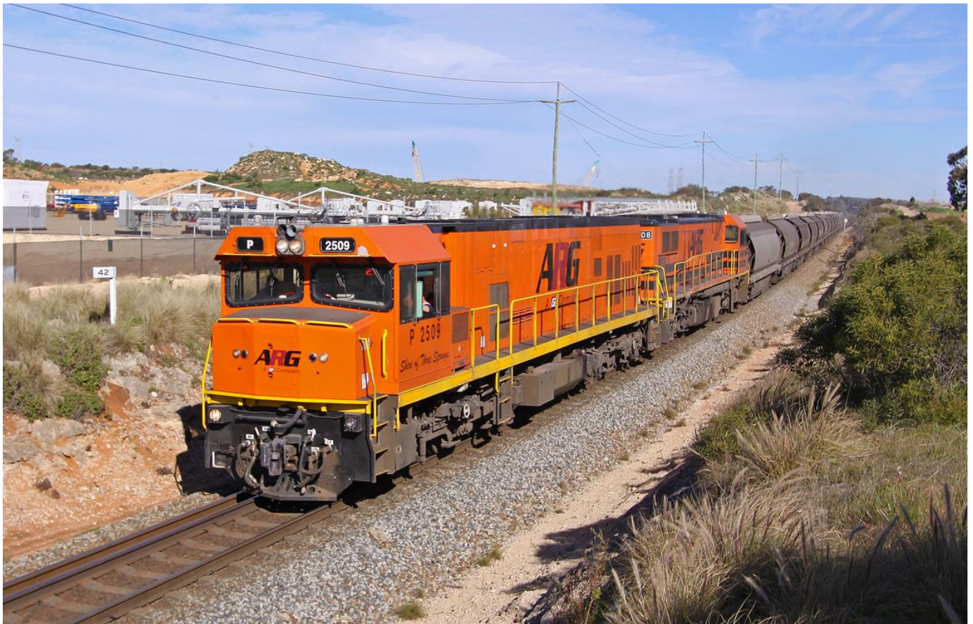
P2509 & DBZ2308 on 1303 empty grain with an Irishman in the driver's seat passes through Hope Valley on the dual gauge bi-directional single line Cockburn Kwinana section July 29th.