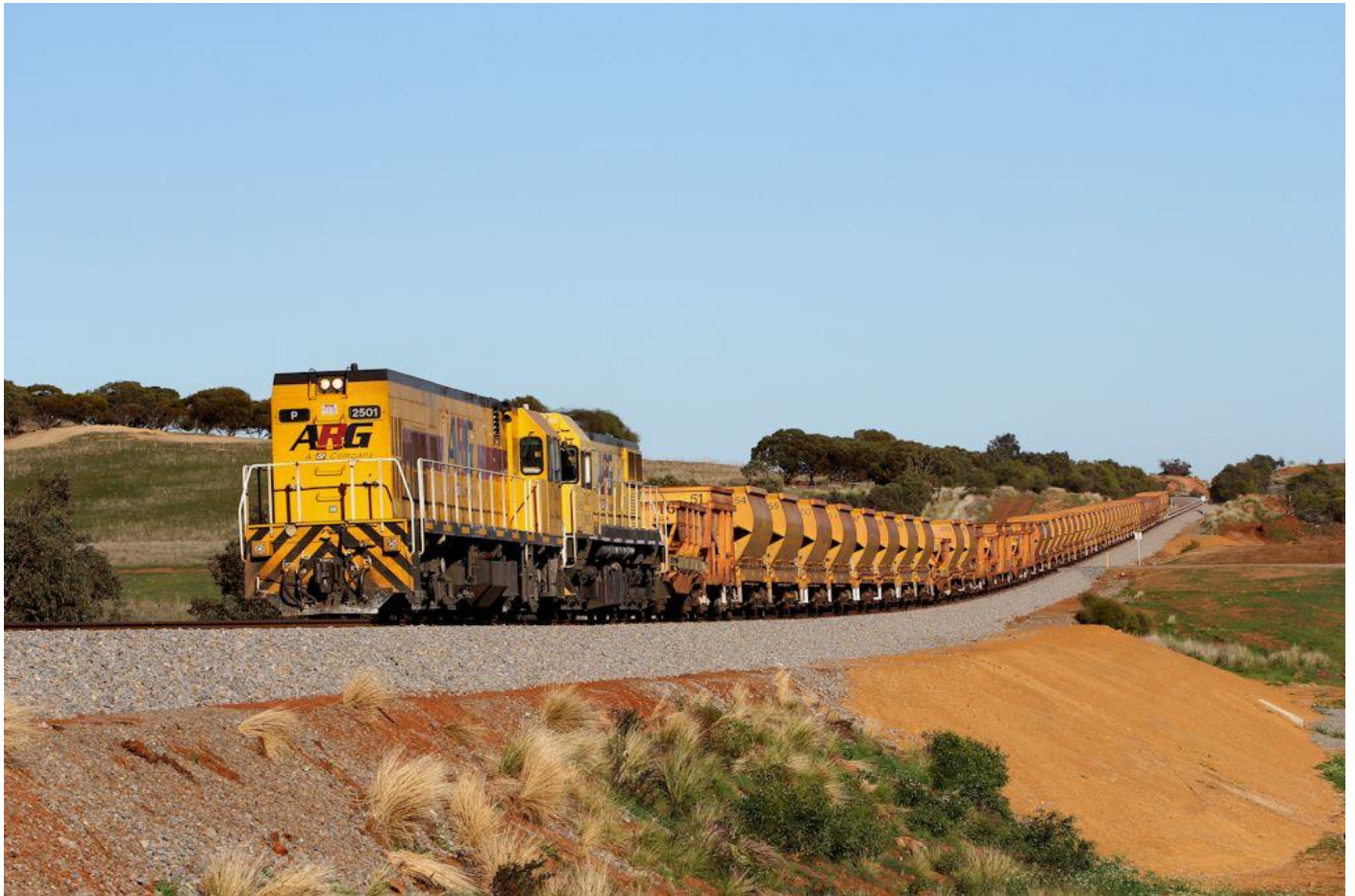
P2501 & DAZ1903 cab to cab on empty ore east of Moonyoonooka July 28th.