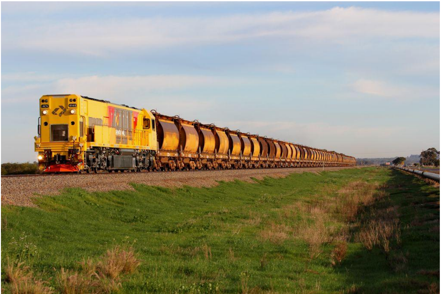
ACN4148 on 1703 mineral sands train at Booniefield north of Dongara July 29th.