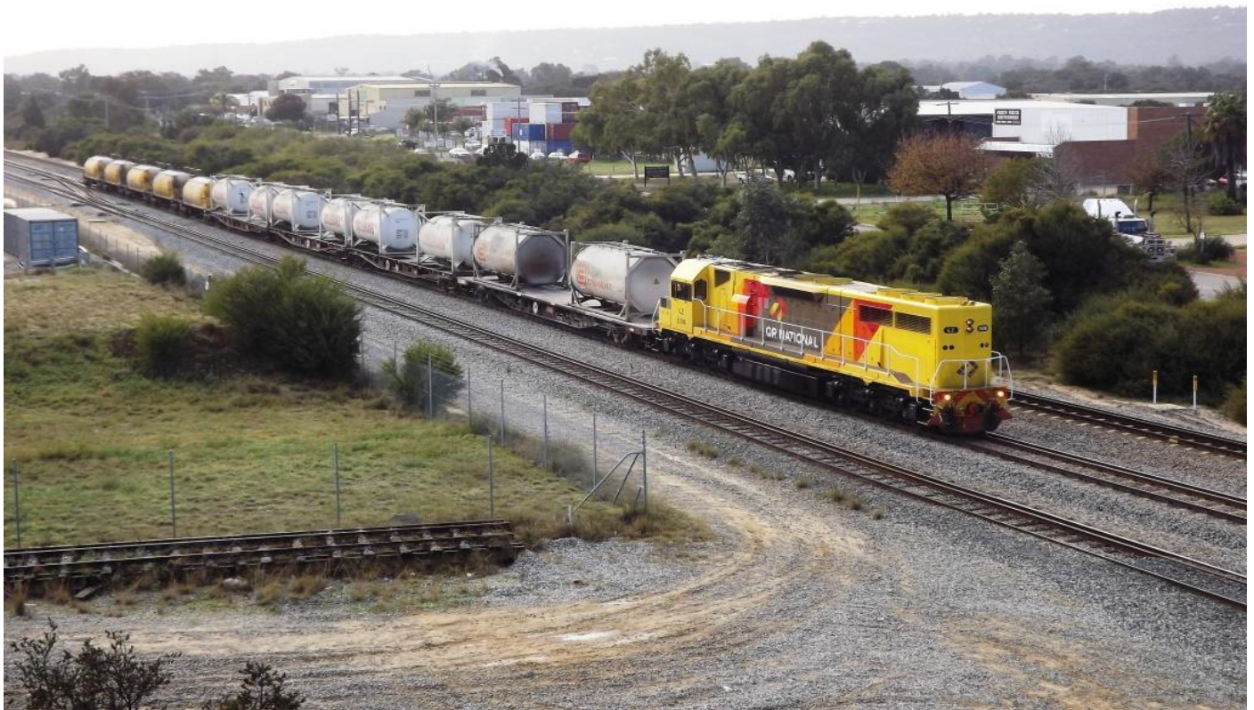
LZ3106 on 4194 Soundcem cement lime shunter departing Forrestfield July 17th.