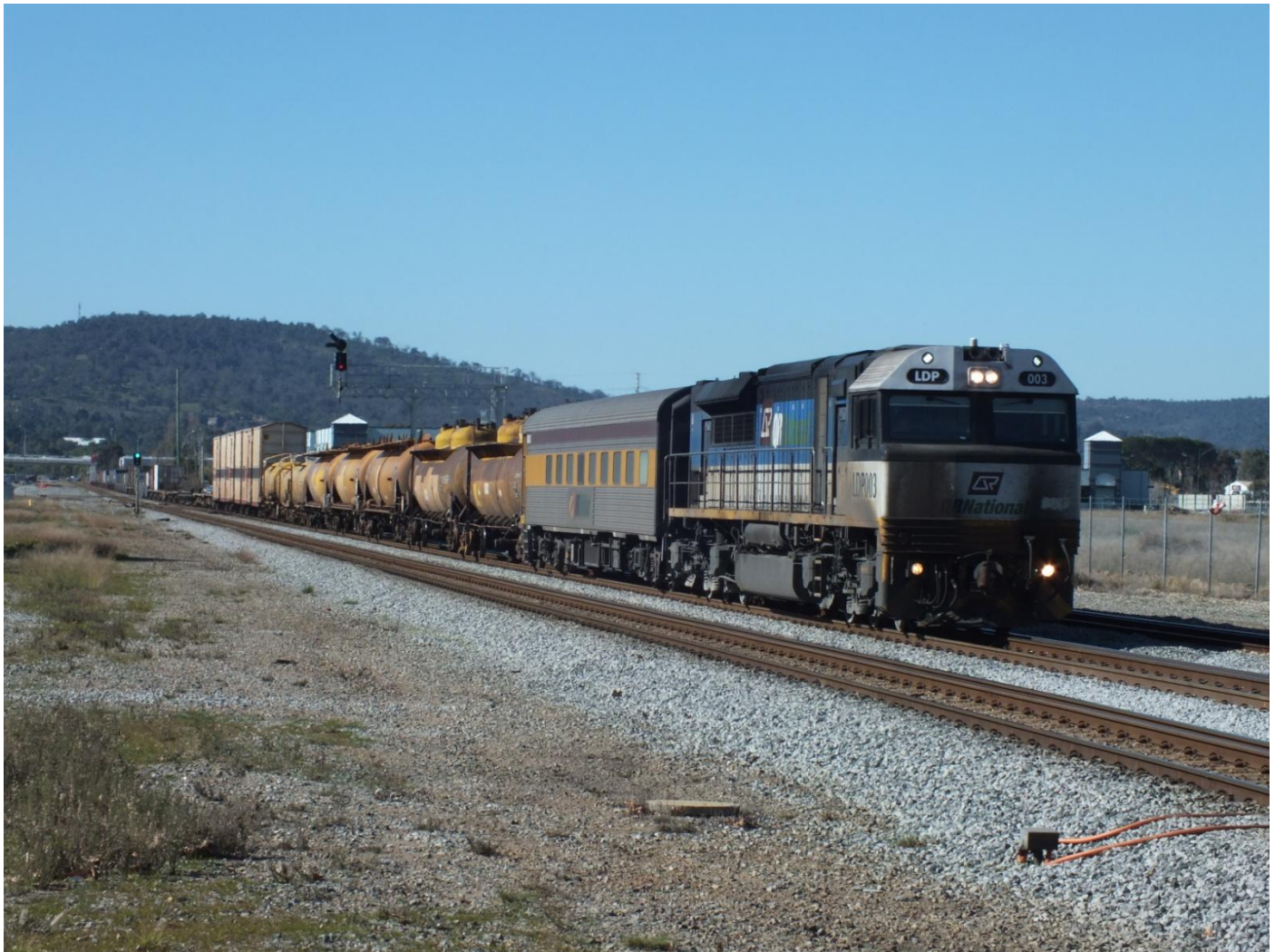
LDP003 on 3MP1 with empty Cook fuel and waters tankers in usual position behind the crew car on one of the last times this loading was hauled by QRN at Midland on July 20th.

Genesee and Wyoming Inc announced on August 1st to NYE [New York Stock Exchange] the sale by its Australian subsidiary Genesee Wyoming Australia Pty Ltd, of certain assets and its fuel sales business in Cook SA to Asciano Pty Ltd [Pacific National] as part of G&W purchase of Alice Springs intermodal and freight terminal purchase from Asciano. The township of Cook was acquired by GWA's corporate predecessor Australian Southern Railroad Pty Ltd as part of its purchase of Australian National's freight assets in 1997. As a result of this sale the cartage of fuel and water to Cook will be taken over by Pacific National with it again coming from South Australia. In recent years fuel has come from BP terminal Kewdale and water obtained at Forrestfield being hauled out on QR National intermodal services to Cook.