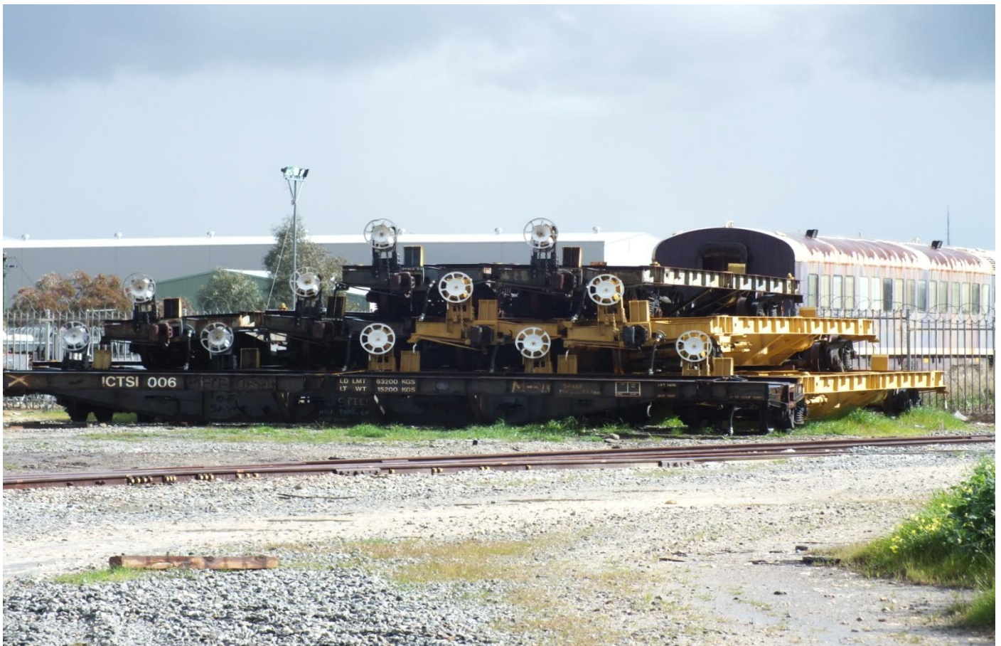
Twelve ex ICTSI Philippines container flattops imported by a previous South Spur management stored on the ground at Gemco Bellevue August 2nd.