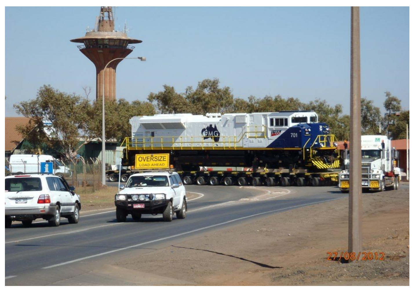
SD70ACe locomotive #701 being hauled out of Port Hedland port area to FMG yard 27/8.