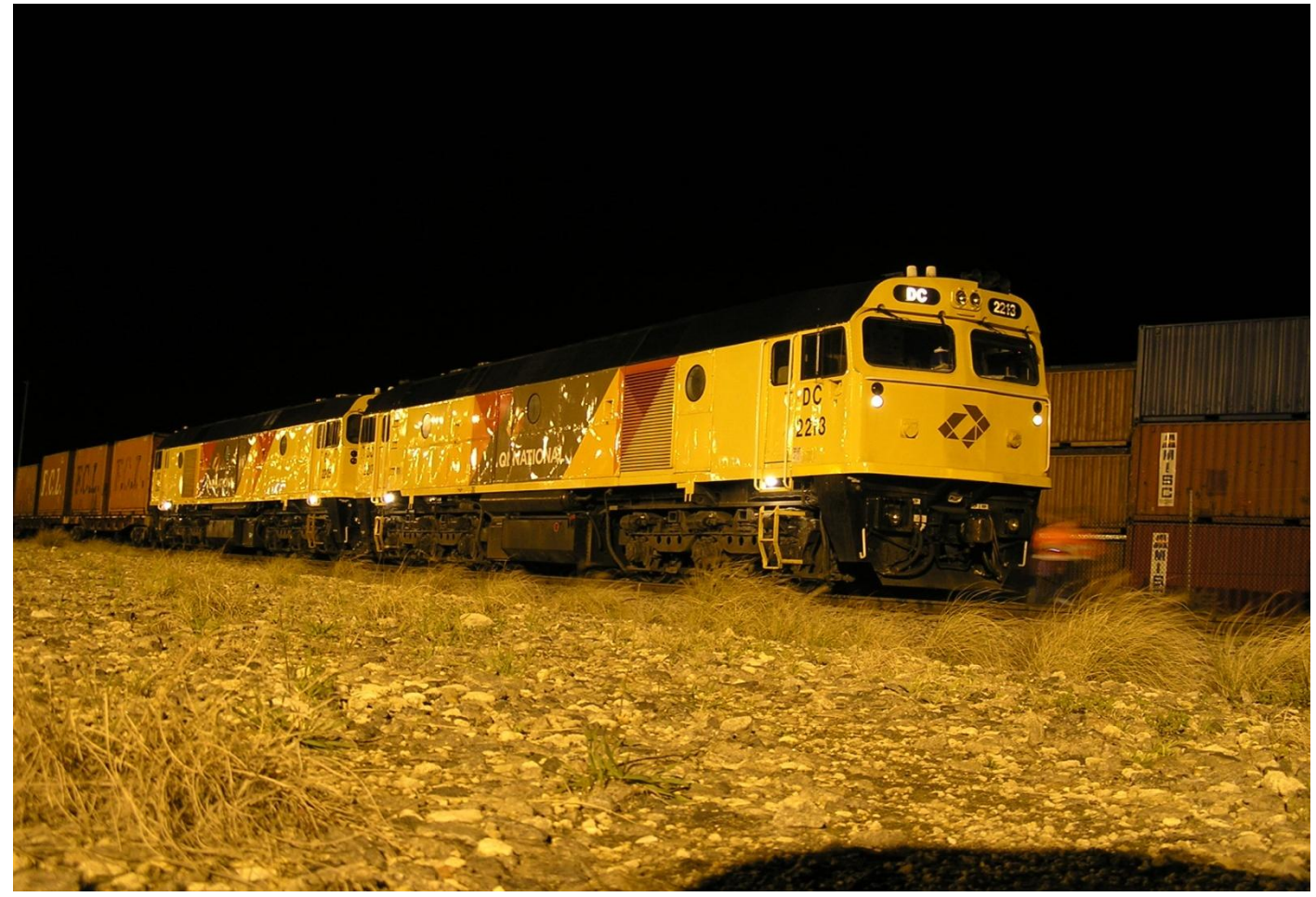
DC2213 & DC2205 on 3141 container train waiting to depart North Quay August 14th.