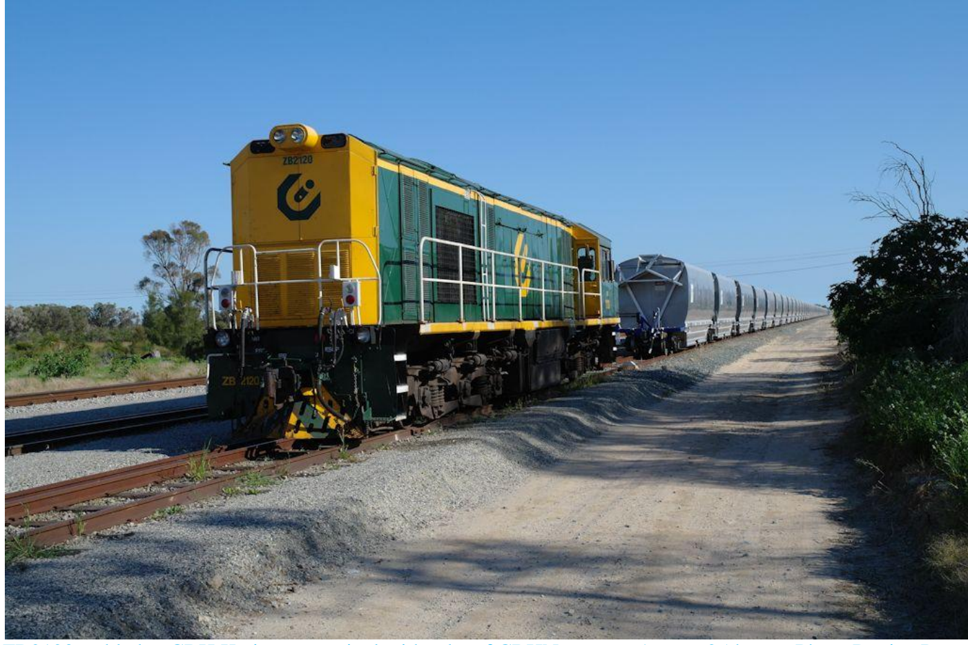
ZB2120 stabled at CBH Kwinana terminal with rake of CBHN wagons August 25th.