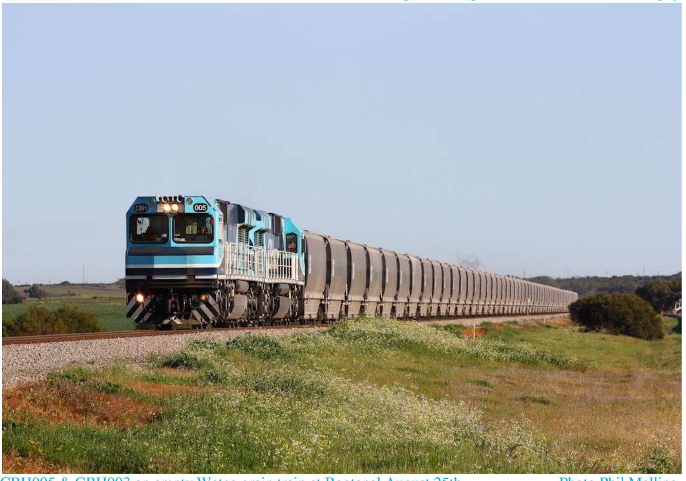
CBH005 & CBH003 on empty Watco grain train at Bootenal August 25th.