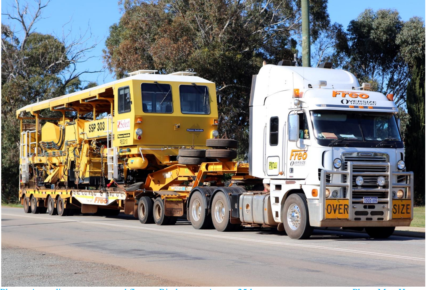
Plasser Australia tamper on road float at Bindoon on August 25th.