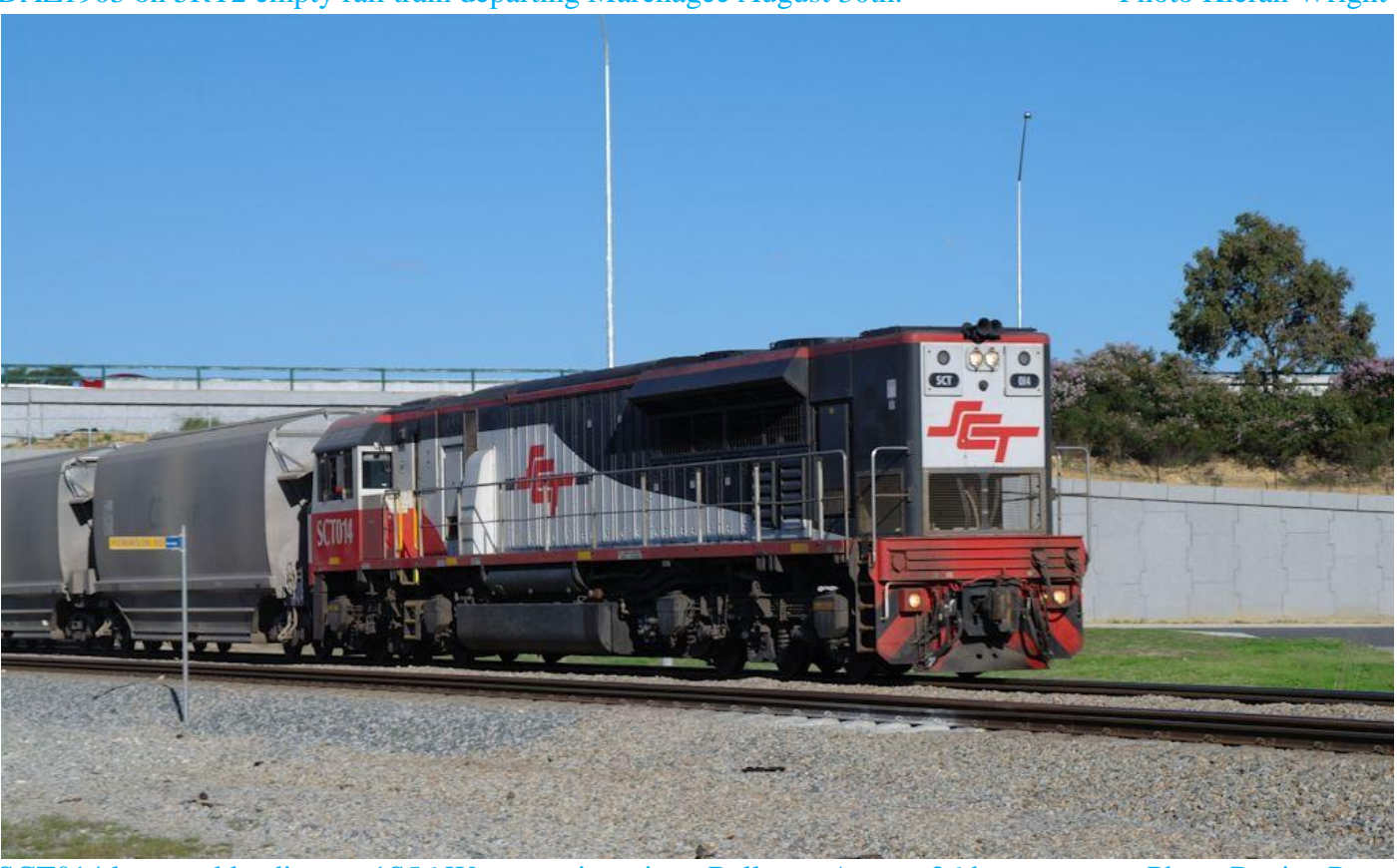
SCT014 long end leading on 1S56 Watco grain train at Bellevue August 26th.