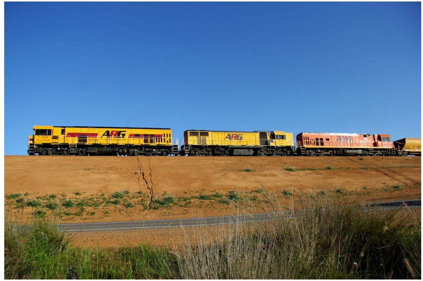
P2508, DAZ1906 & P2516 on 7720 empty ore to Perenjori west of Bringo August 25th.