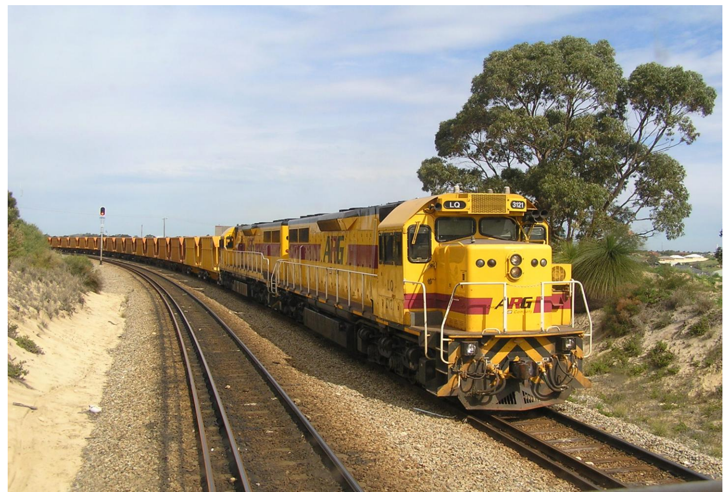
LQ2121 & LZ3112 on 6035 empty ore run through Cockburn Junction 17/8.