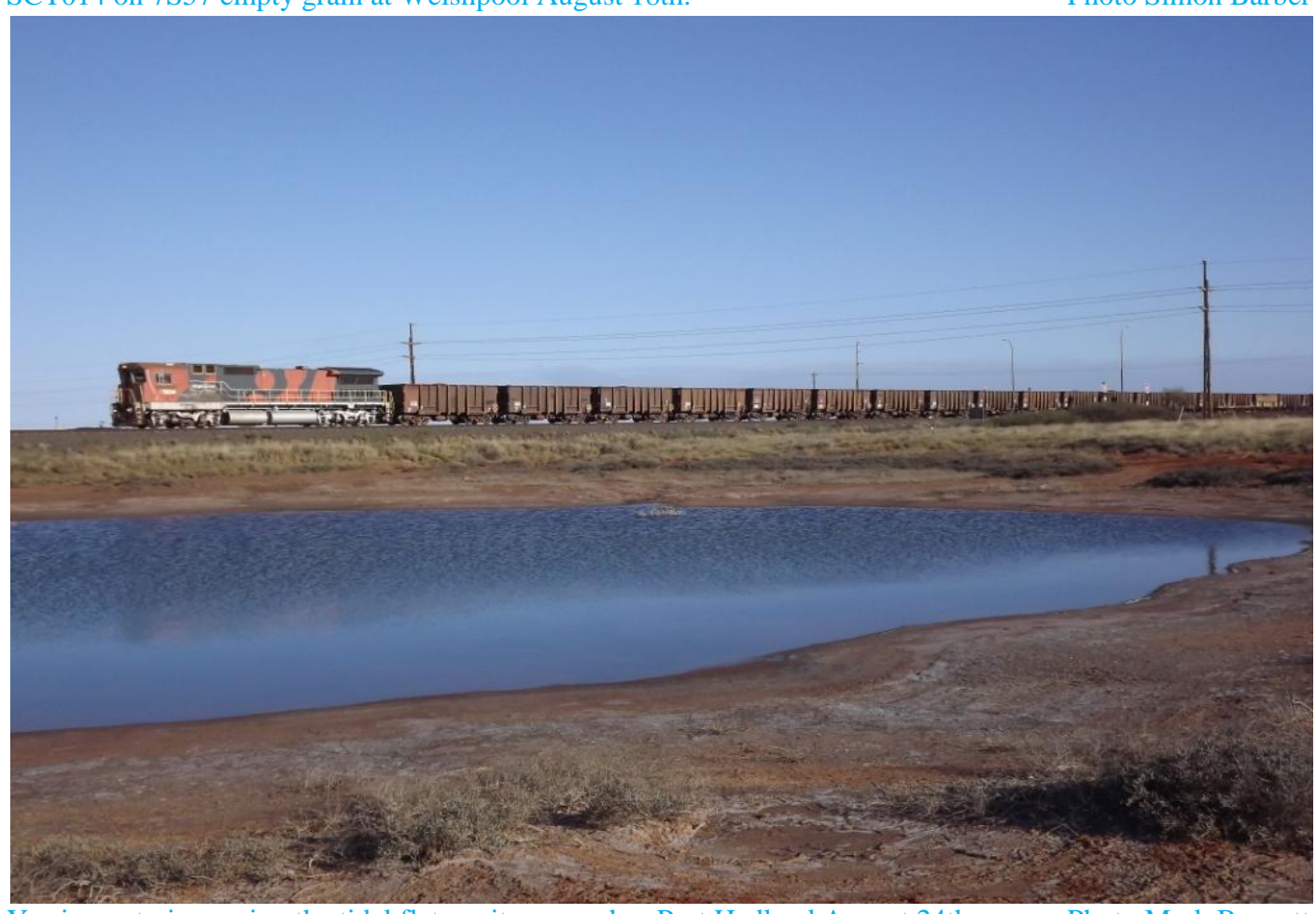
Yarrie ore train passing the tidal flats as it approaches Port Hedland August 24th.