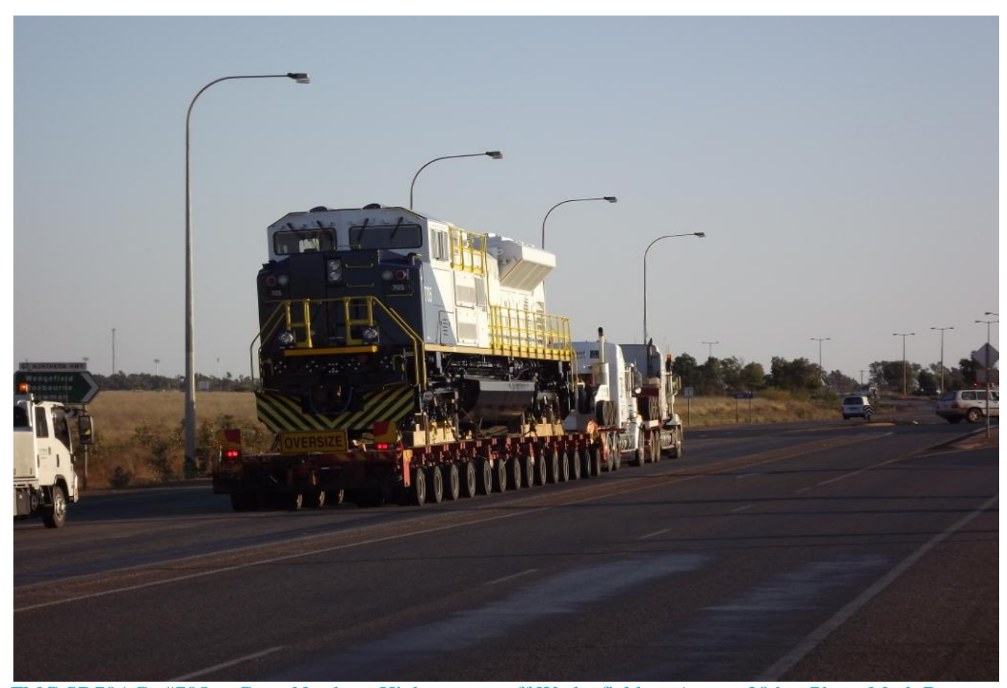
FMG SD70ACe #705 at Great Northern Highway turnoff Wedgefield on August 28th.