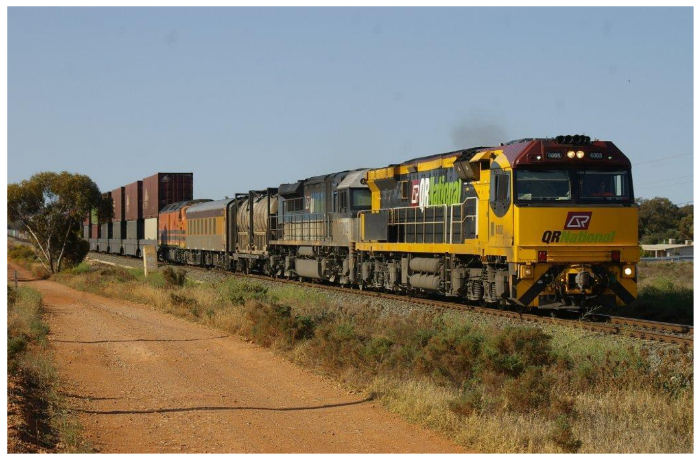
6008, LDP002 & CLP10 on 6MP1 QRN intermodal at West Kalgoorlie August 26th.