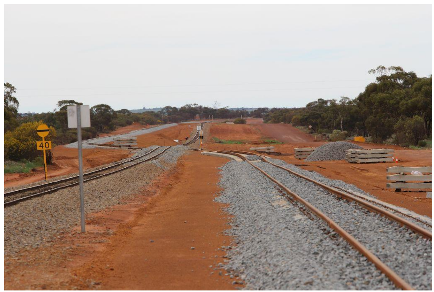
Evaside Road level crossing at Pintharuka with old Perenjori line still in use August 19th.