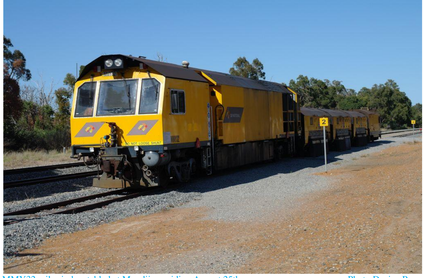
MMY32 rail grinder stabled at Mundijong siding August 25th.