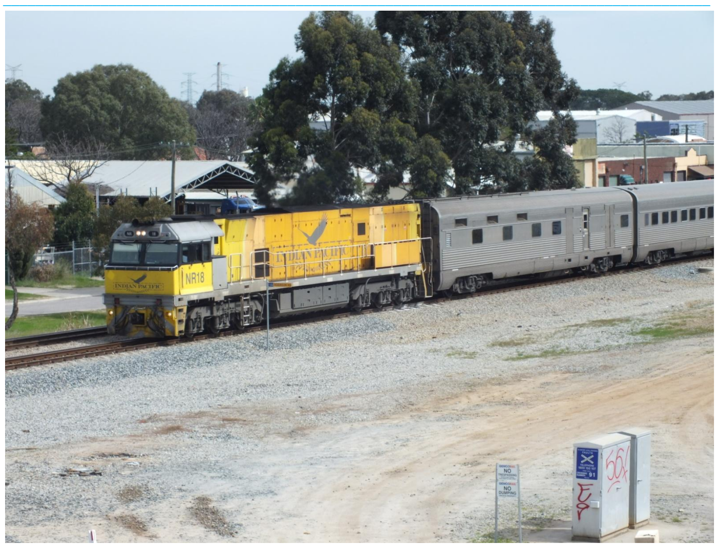
NR18 on 1PA8 Indian Pacific passenger train at Bellevue August 18th.

CBH011 the final MP27CN locomotive on order was railed at north Port Fremantle on August 25th then hauled to Gemco Forrestfield for commissioning. CBH012 thru CBH017 heavier MP33CN locomotives have all been completed by MotivePower and are in transit to WA. The five standard gauge MP33C locomotives have been numbered CBH118 thru CBH122 to differentiate and avoid confusion with the narrow gauge units also classed CBH.