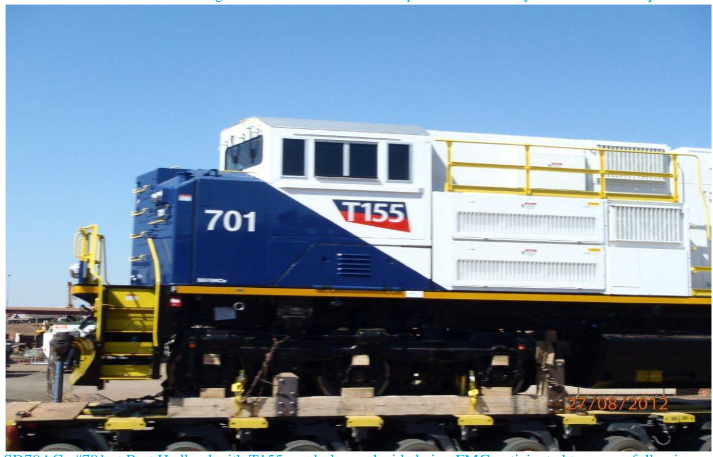
SD70ACe #701 at Port Hedland with T155 symbol on cab side being FMG anticipated tonnages following the expansion of it operations to 155 million tons pa capacity August 27th.