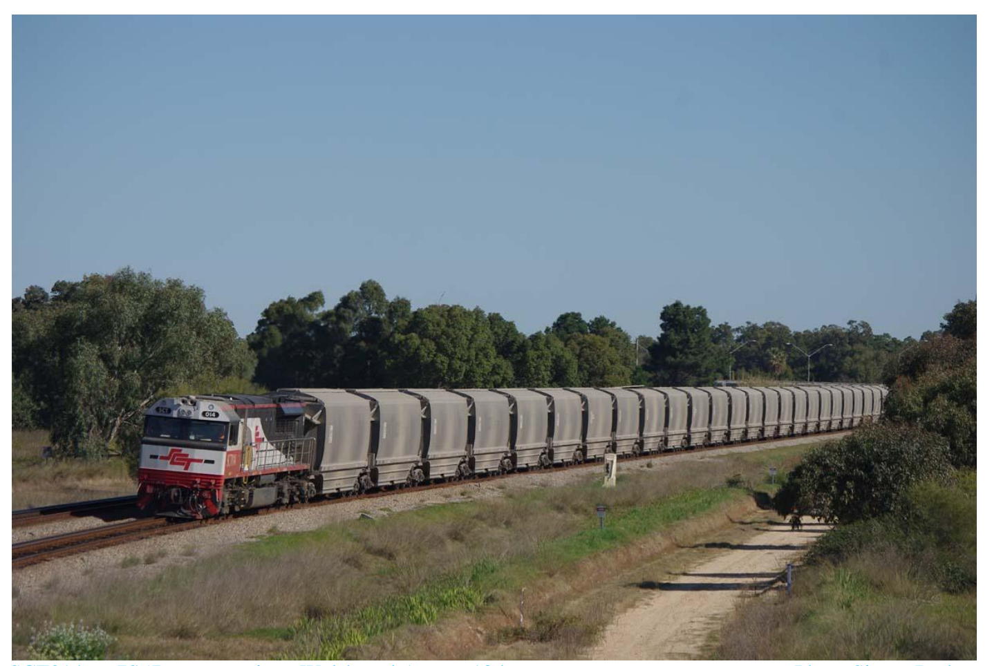
SCT014 on 7S57 empty grain at Welshpool August 18th.