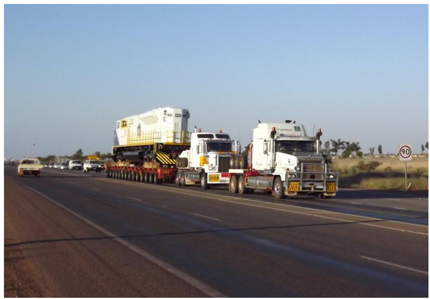
FMG SD70ACe #705 on float being hauled through Wedgefield on August 28th.