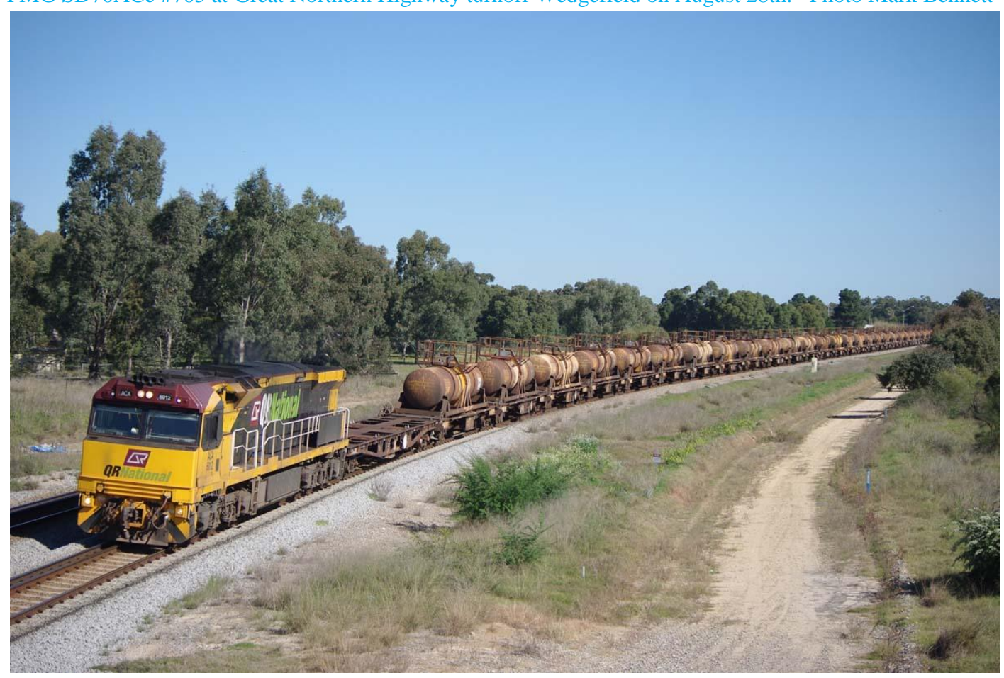
ACA6012 on 7167 empty acid tankers at Welshpool August 18th.