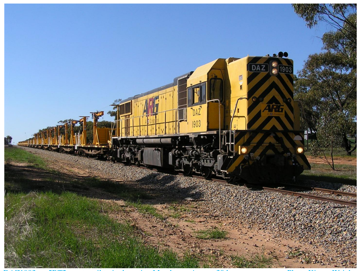
DAZ1903 on 5RT2 empty rail train departing Marchagee August 30th.