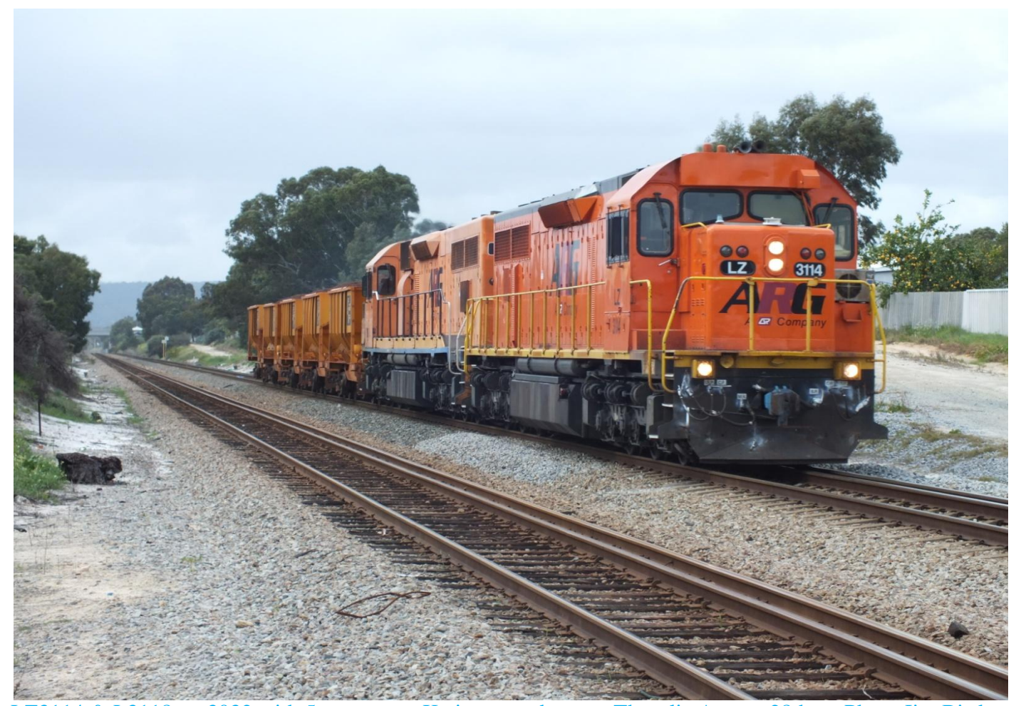
LZ3114 & L3118 on 3032 with 5 ore cars to Kwinana to dump at Thornlie August 28th.