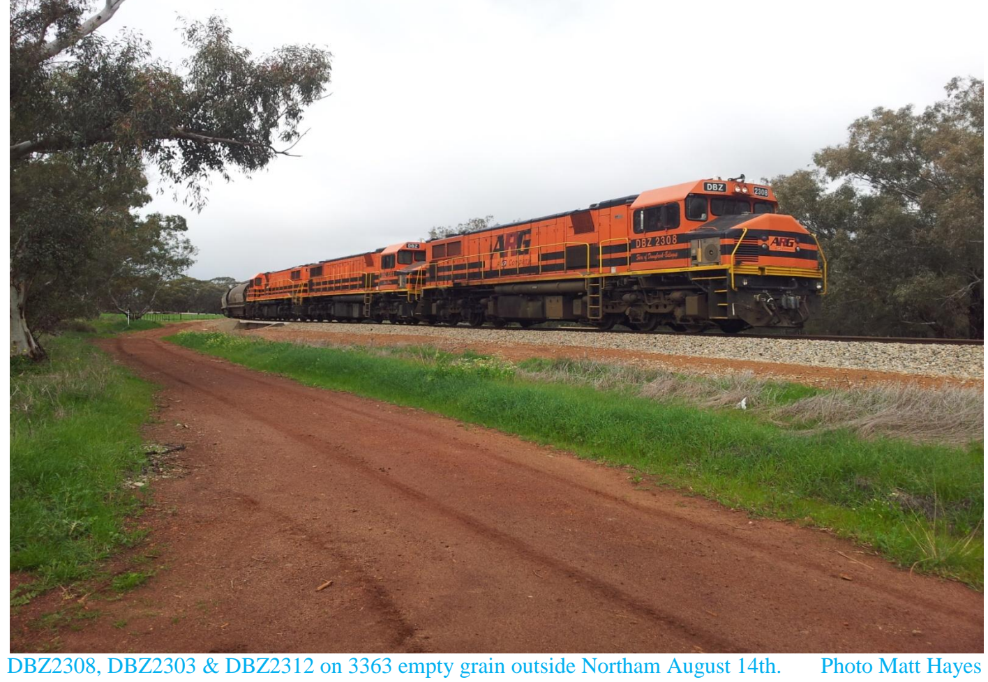
DBZ2308, DBZ2303 & DBZ2312 on 3363 empty grain outside Northam August 14th.