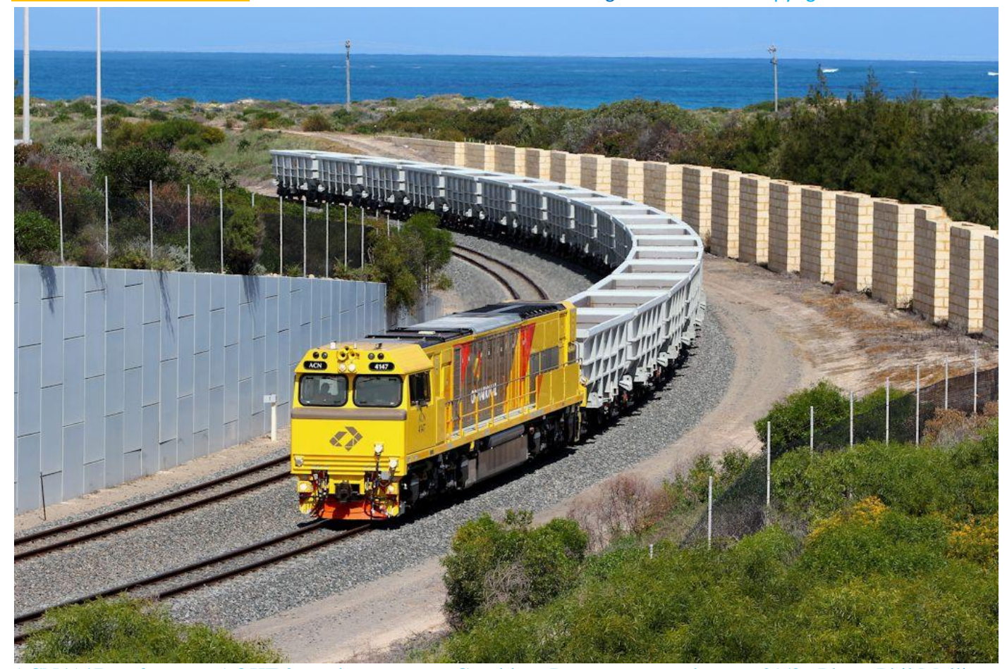
ACN4147 on 8 empty AOKF 2xpack ore cars to Geraldton Port to test car dumper 29/8.

West Australian Railscene e-Mag is published weekly by Jim Bisdee on rail happenings on West Australian Railroads WWW.WESTERNRAILS.COM follow West Australian Railscene e-Mag on facebook Copyright Jim Bisdee © 2012