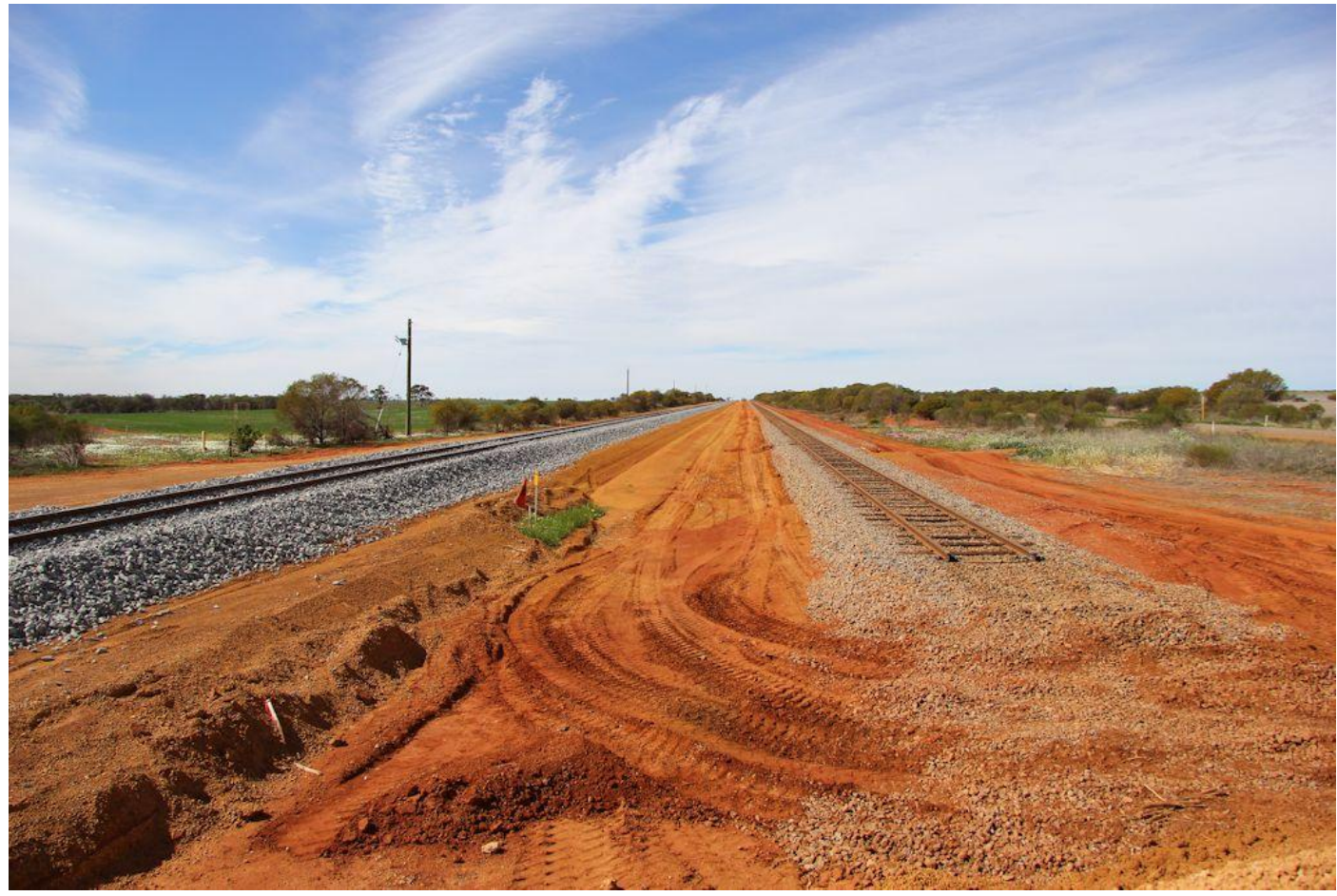
Williams Road level crossing south of Mullewa showing abandoned old line on right with new heavy duty Perenjori line now in use to the left August 19th.