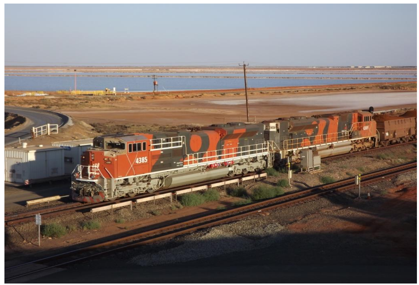
New SD70ACe/lc 4385 & 4311 on loaded ore train entering Nelson Point August 28th.