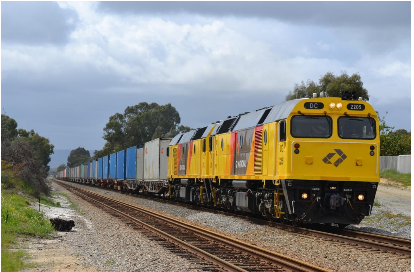
DC2205 & DC2213 on 4142 North Port container train at Thornlie September 5th.