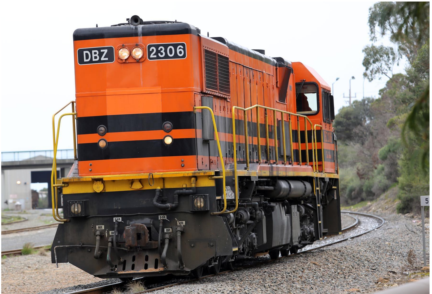
DBZ2306 light engine running round its train at Alcoa Kwinana September 2nd.