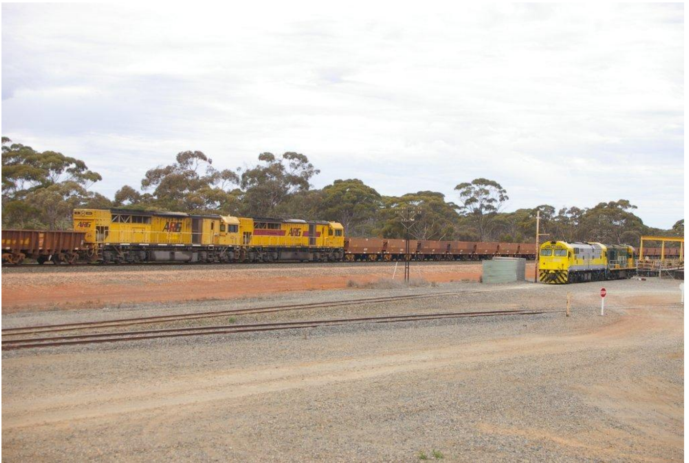
Q4011 & Q4015 DPU units on 1414 empty ore at Hampton September 2nd.