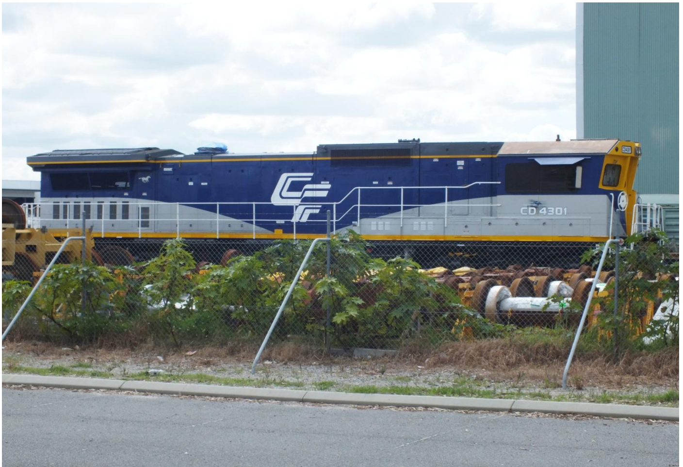
CFCLA CM40-8M CD4301 stabled in UGR Bassendean yard September 2nd.