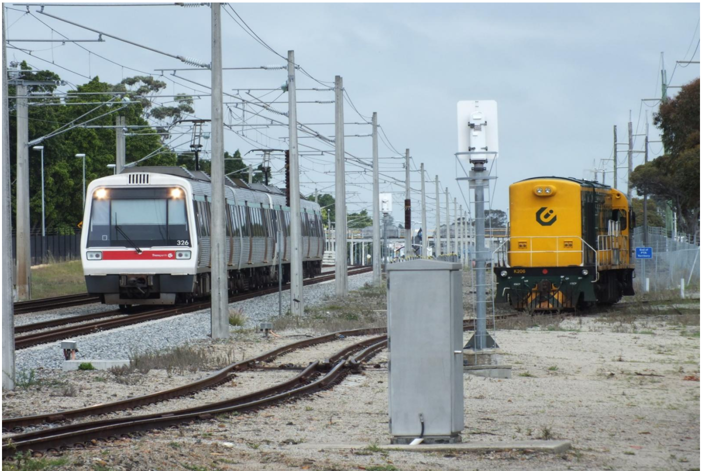
EMU set #326 passes K206 on 2QB1 crew training in Bassendean siding September 3rd.