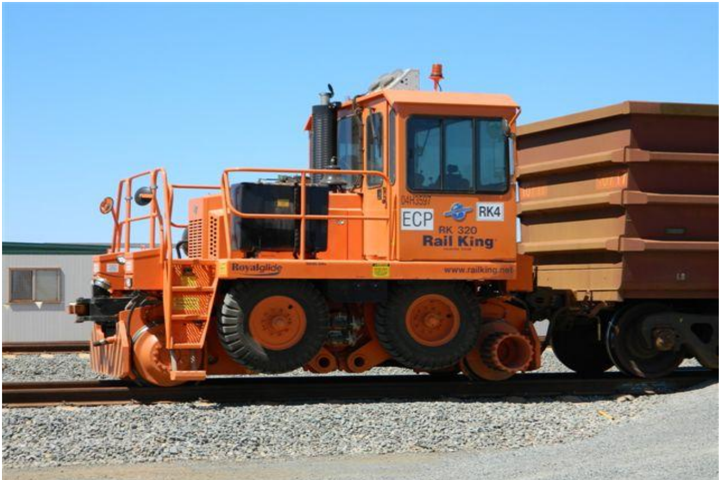
RK4 shunts ECP fitted ore car pairs 86 road 8 Mile yard Dampier September 5th.