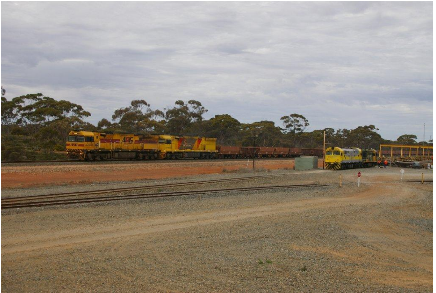
AC4305 & ACB4406 on 1414 empty ore passes Qube rail train in Hampton siding September 2nd.