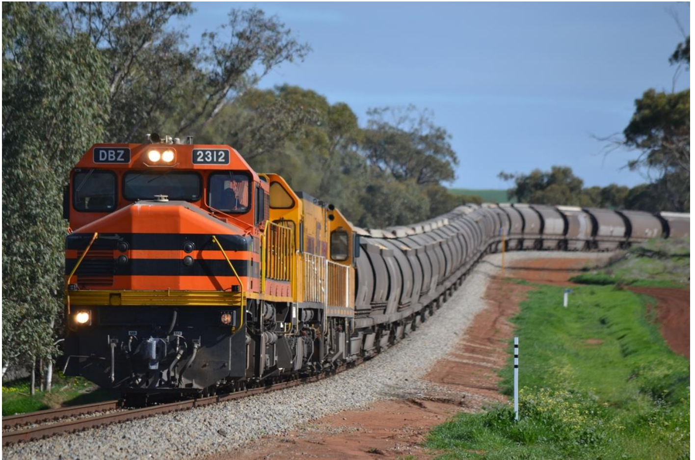
DBZ2312, AB1503 & P2514 on 7362 grain train ex Koorda approaching Northam September 1st.