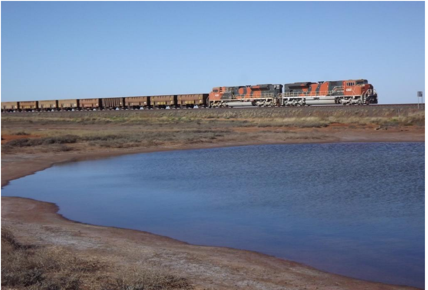
SD70ACe/lc 4365 & 4357 passing edge of Port Hedland harbour August 22nd.