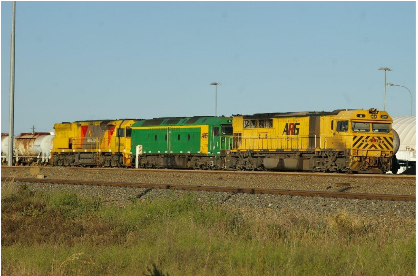
Q4007, ALZ3208 & ACB4402 in West Kalgoorlie yard August 31st.