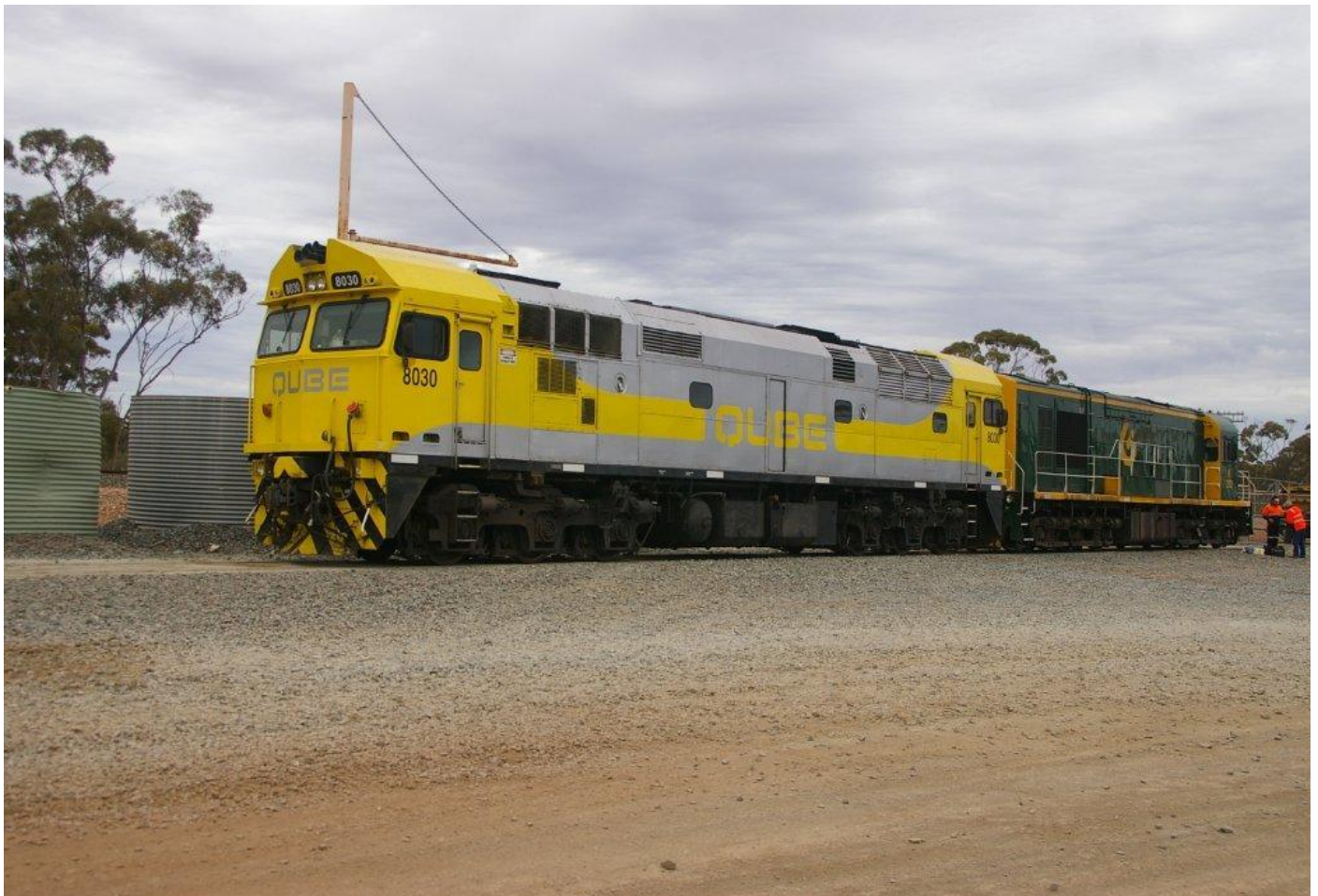
8030 & K210 stabled at Hampton on September 2nd.