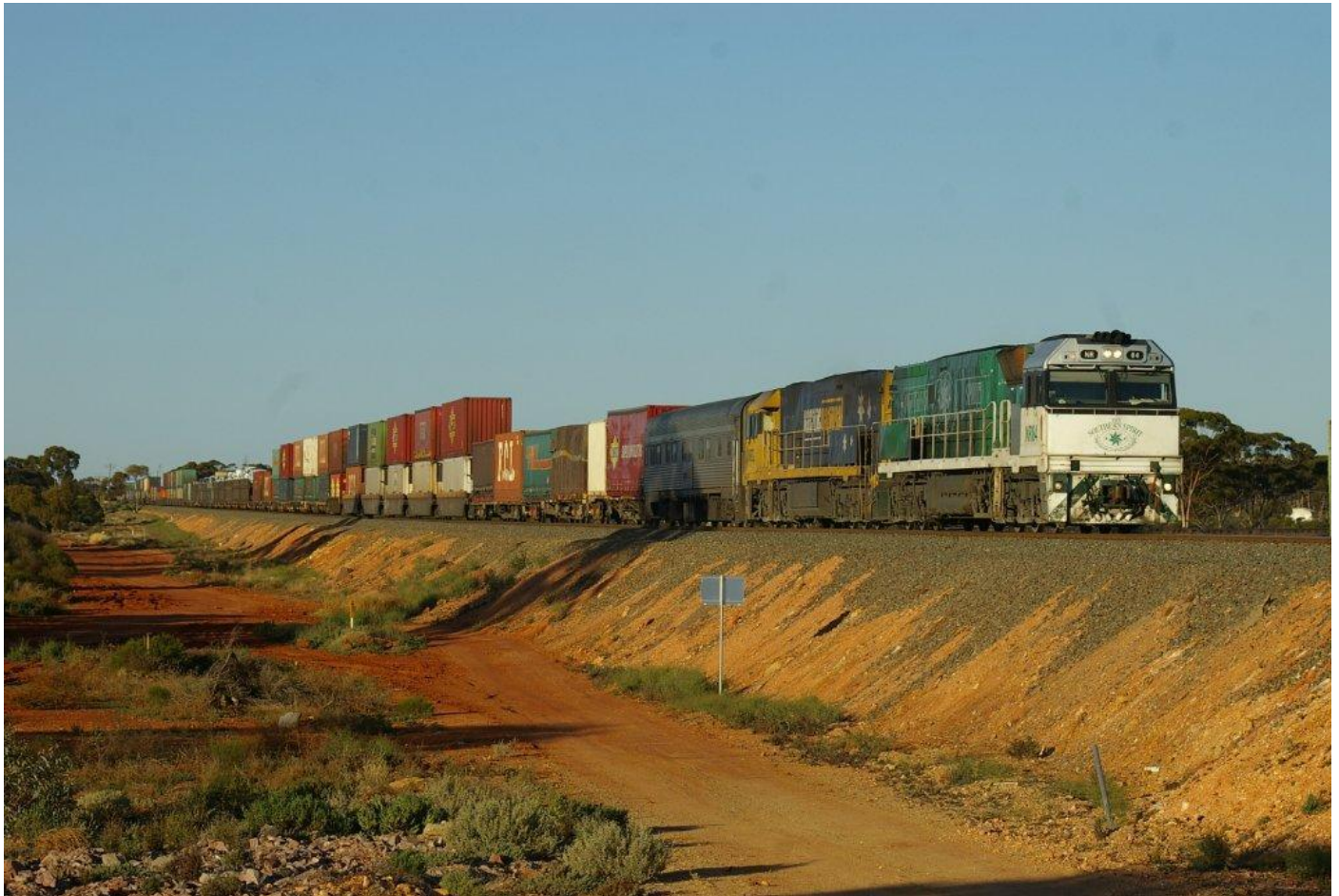
NR84 & NR22 on 4MP5 intermodal at Binduli August 31st.