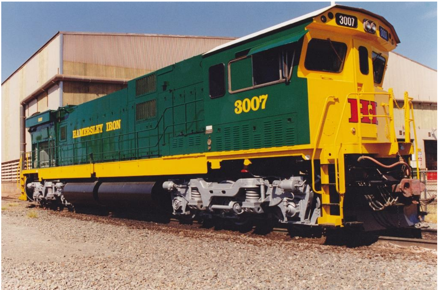
With CM40-8M Pilbara cab locomotives being overhauled here are a couple historic photos of Hamersley Iron Pilbara cab locomotives 3007 and 3017 the last Alco's overhauled in 1991.