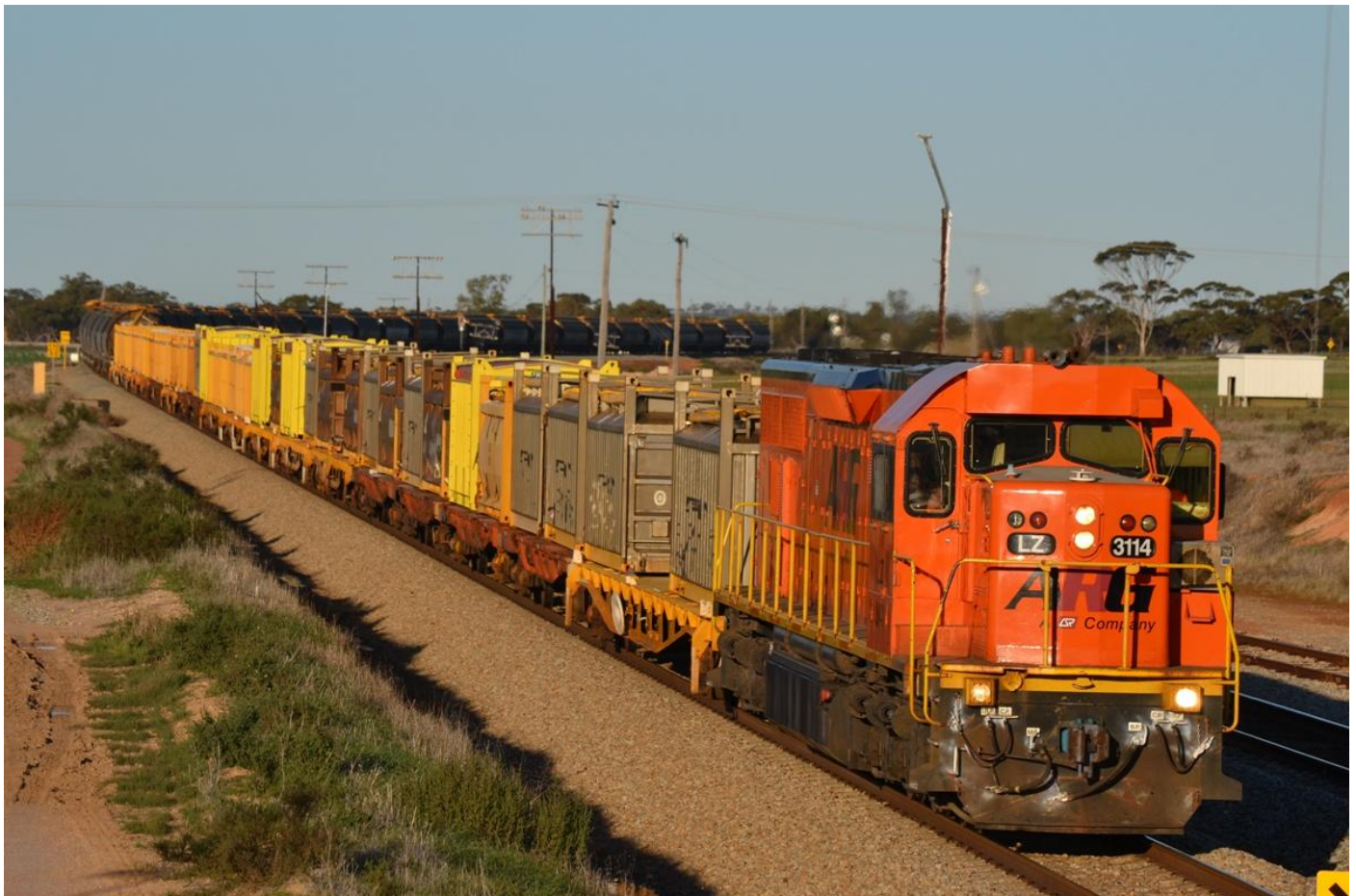
LZ3114 on 5474 salt train and empty grain wagon transfer at Cunderdin August 8th.