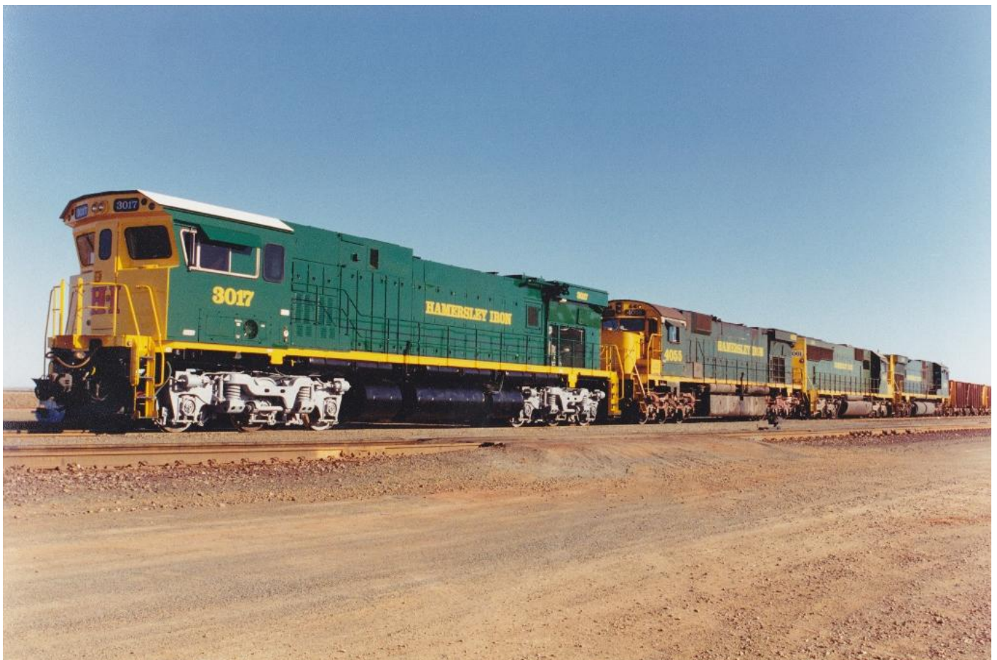
C636R 3017 with M636 4055, 6061 & C636R on empty ore train load test at 7 Mile c1991.