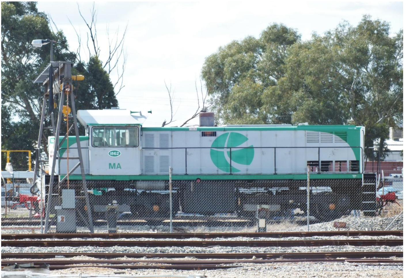
MA1862 stabled in Flashbutt rail welding yard Midland September 2nd.