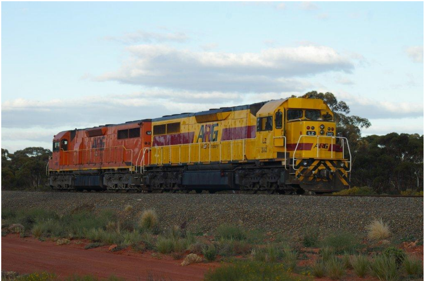
LZ3119 & LZ3112 being turned on the Binduli triangle August 29th.