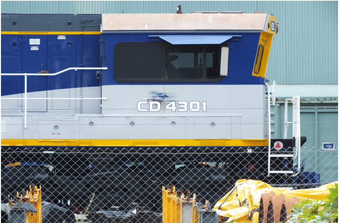
Cab shot of CD4301 in UGR yard September 2nd.