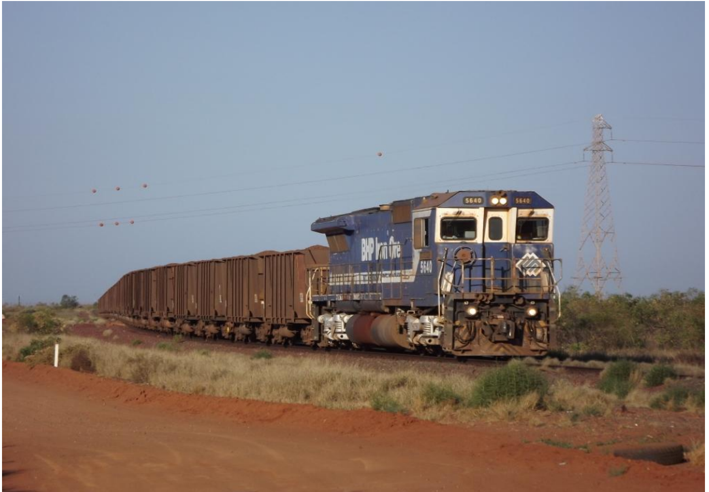
5640 on loaded Yarrie ore train descending the grade towards South Hedland 25/8.