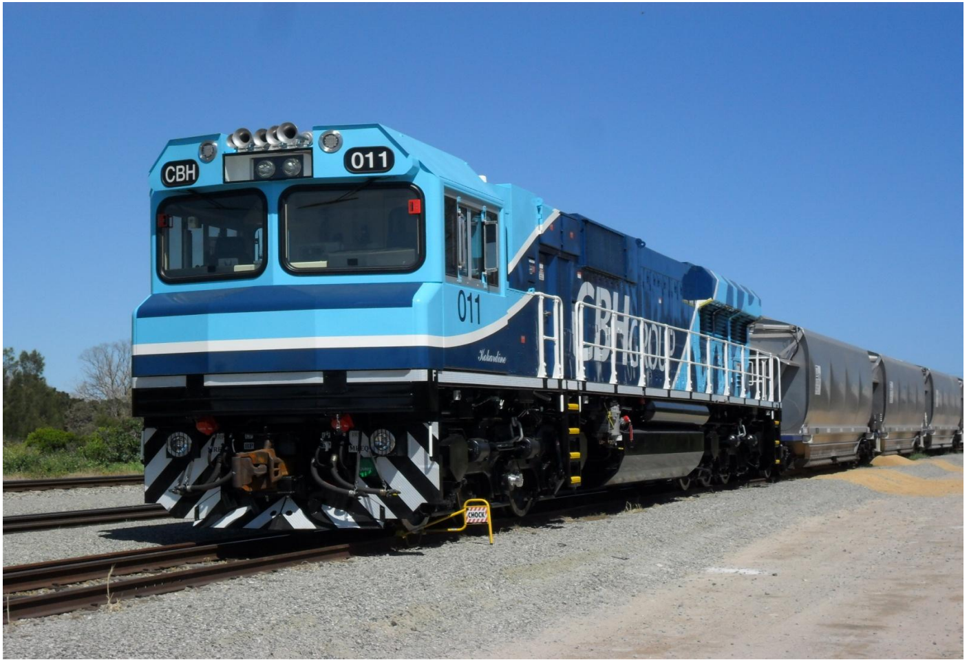
CBH011 the final MP27CN to enter service at CBH Kwinana September 8th.