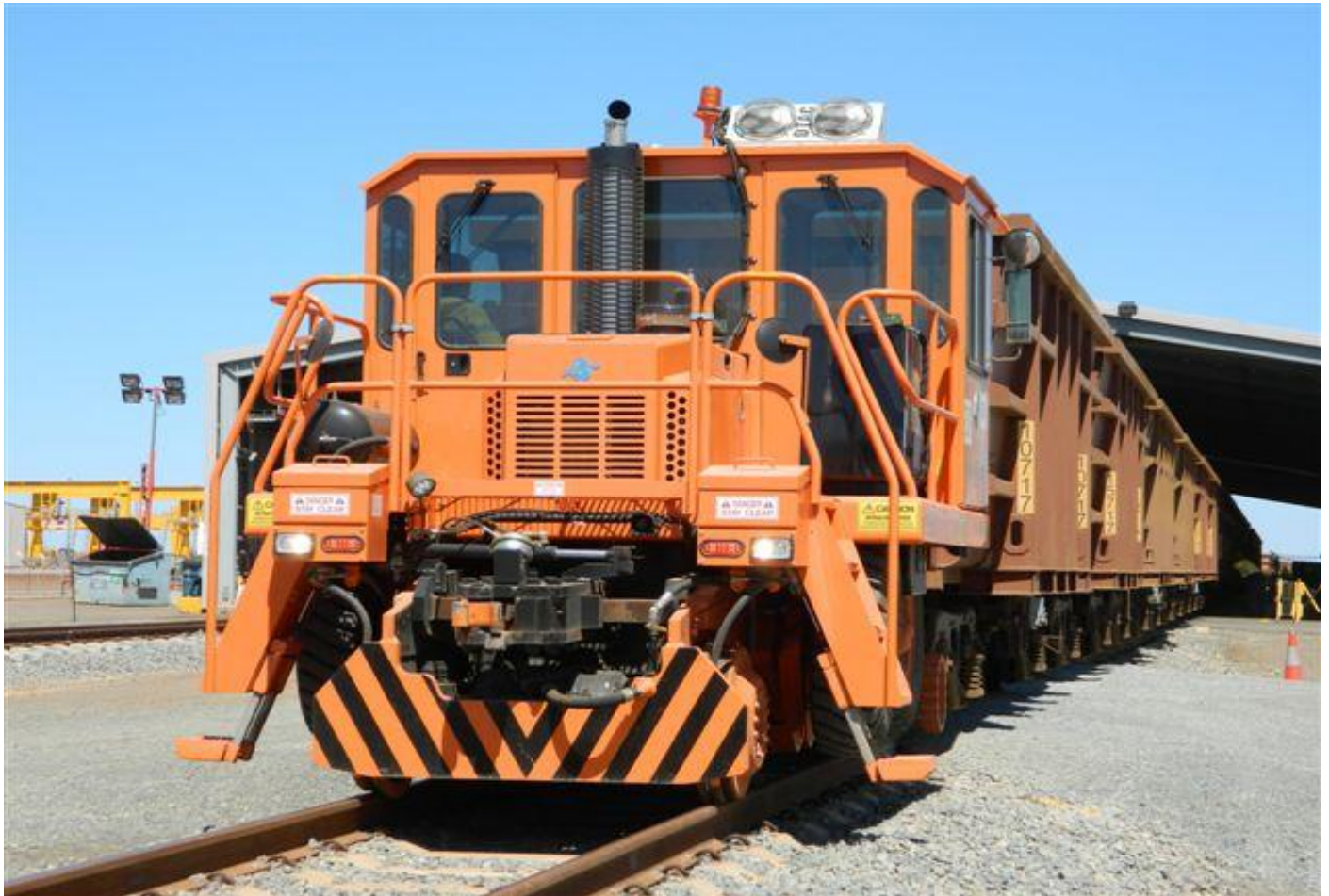
Rail King track mobil shunting out latest ECP fitted ore car pairs at 86 road 8 Mile yard Dampier 5/9.