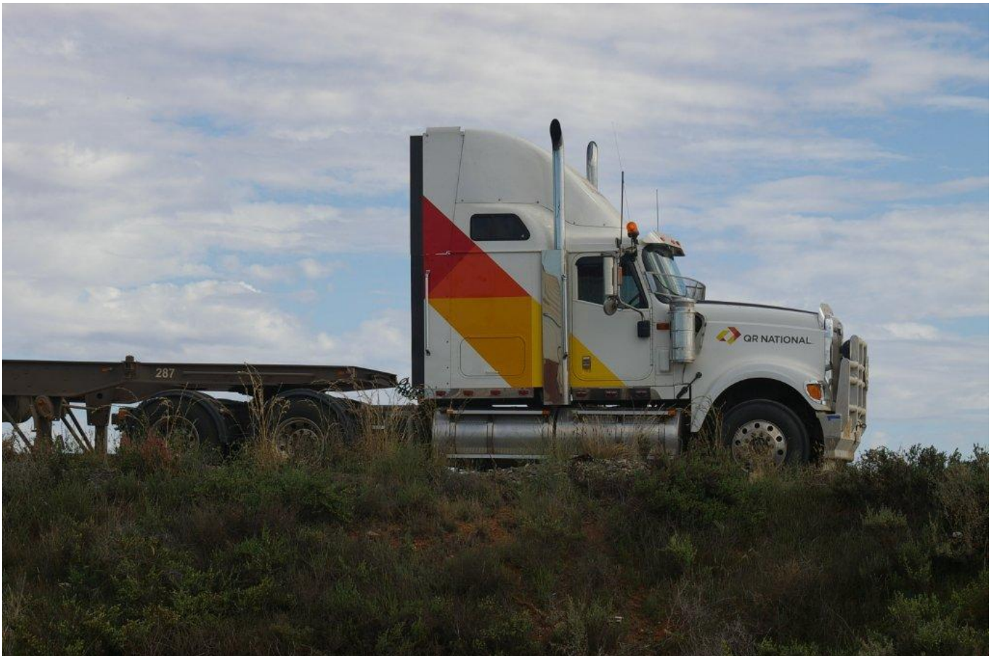
QR National is not only a railway it's also a trucking company.