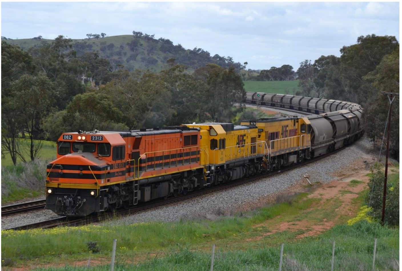
DBZ2312, A1503 & P2514 on 7362 grain at Lloyds Crossing 1st September.