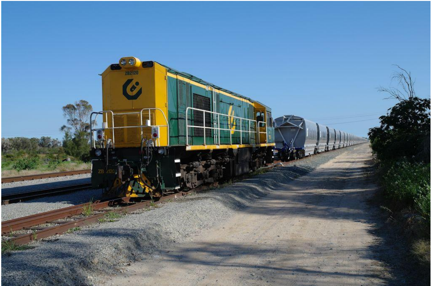
ZB2120 and rake of grain wagons stabled at CBH Kwinana August 25th.