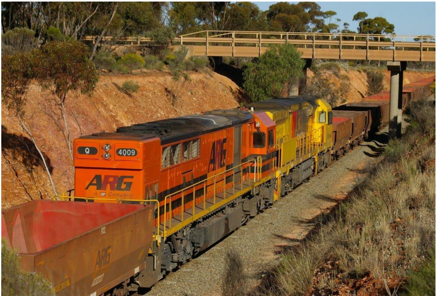
Q4009 & ACB4405 DPU units on 7414 at Great Eastern Highway Bridge 1/9.