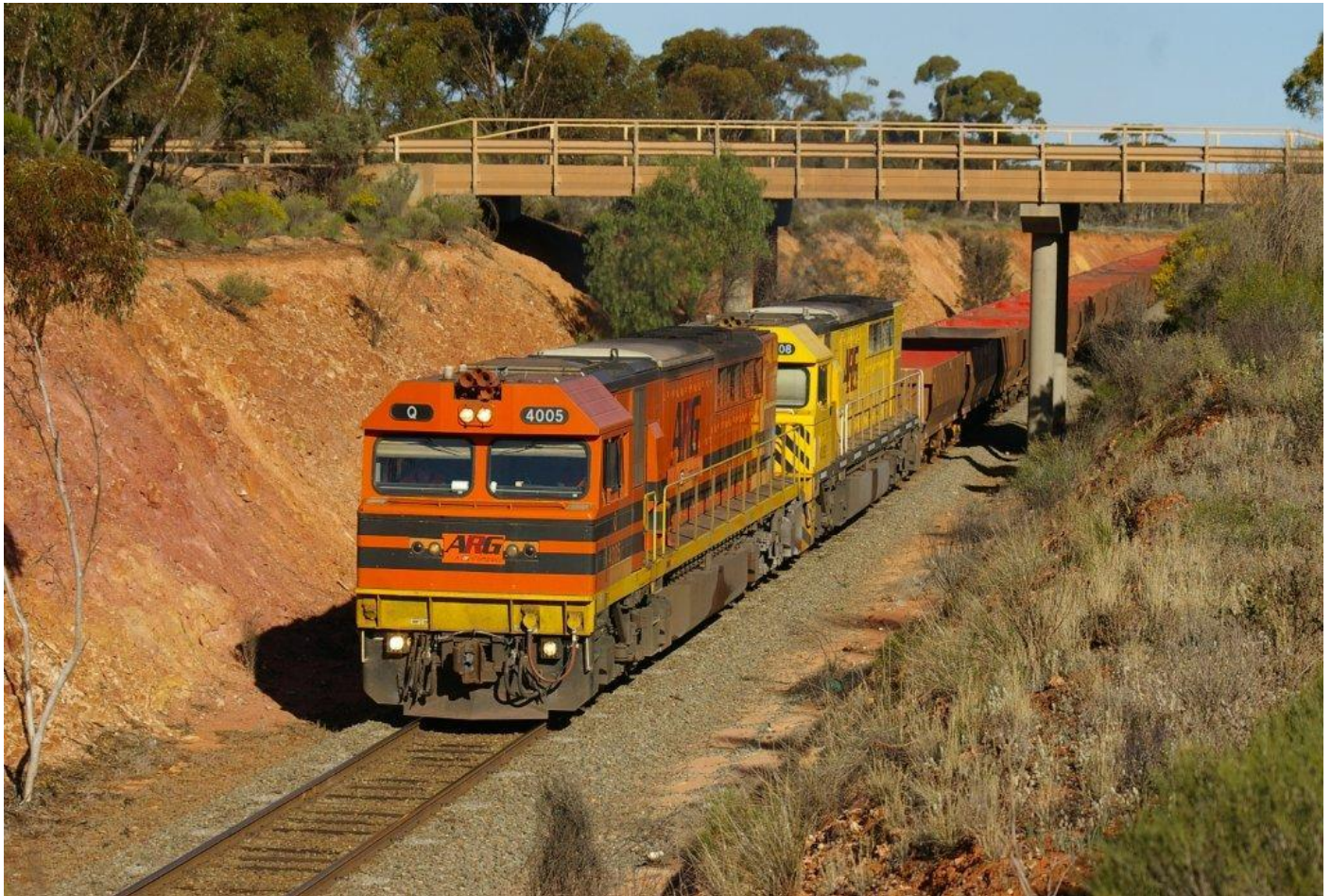
Q4005 & Q4008 on 7414 empty ore train passing under Great Eastern Highway Bridge September 1st.