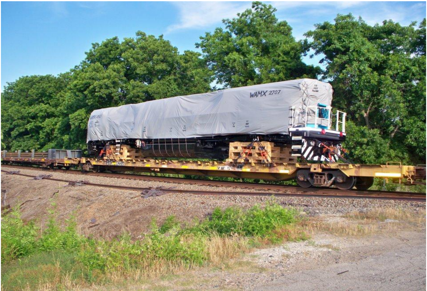
WAMX2707 [CBH008] on Van Buren Sub of the UP May 27th.