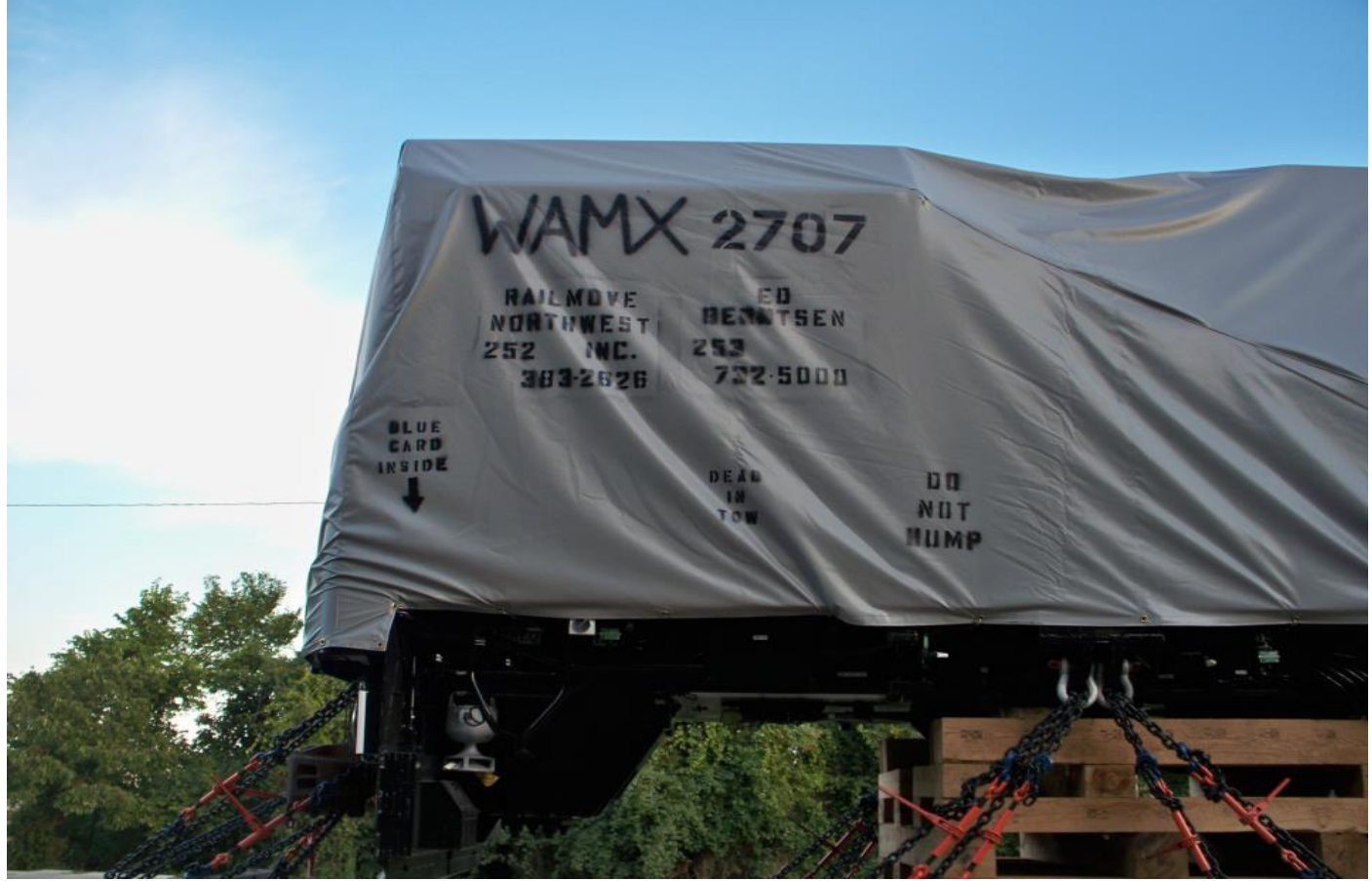
Cab end WAMX2707 [CBH008] on flatcar on UP freight van Buren Sub Ok May 27th.