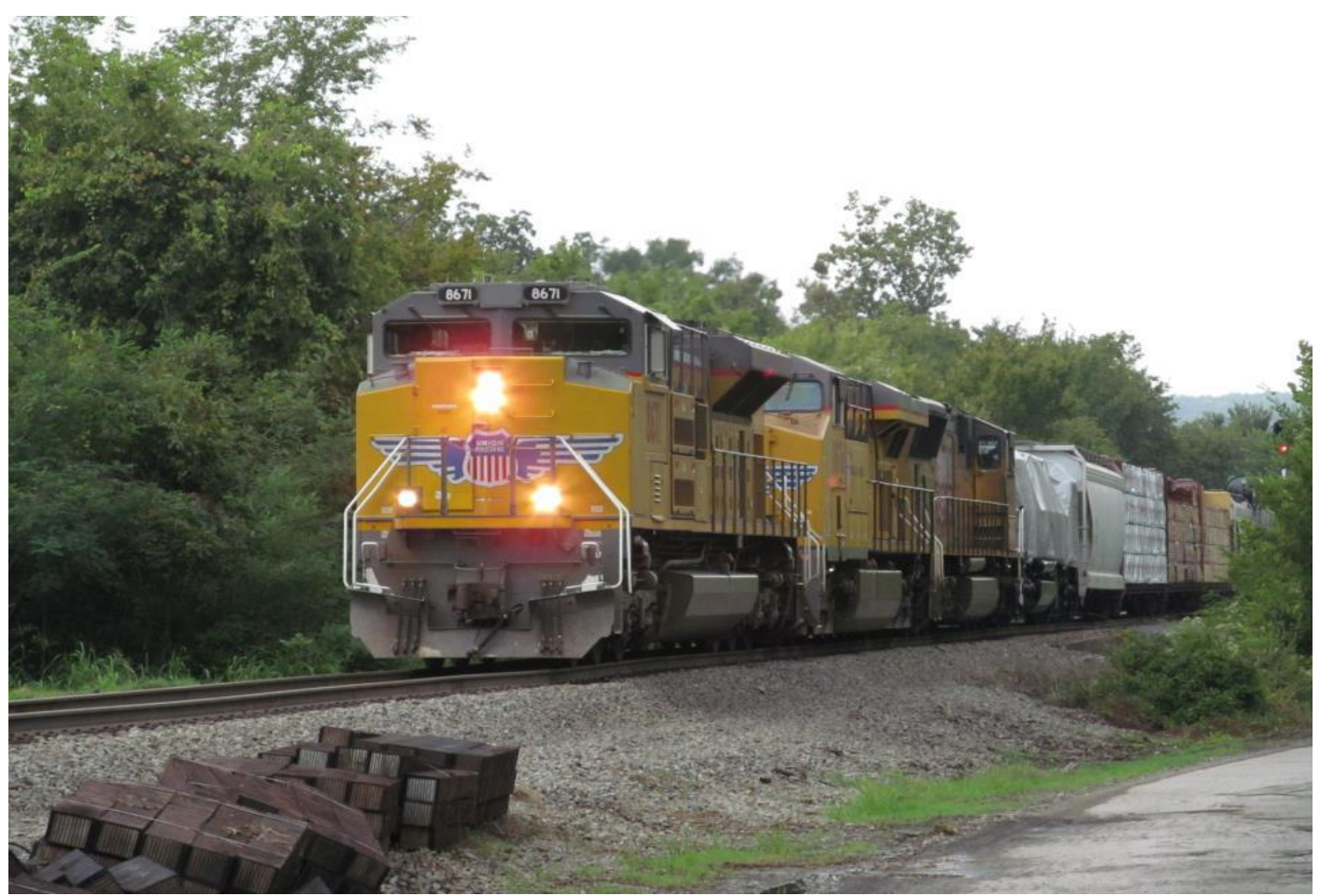
UP 8671, 7876 & 4804 WAMX3308 [CBH120] southbound M-KCPB Dora Ok 15/9.