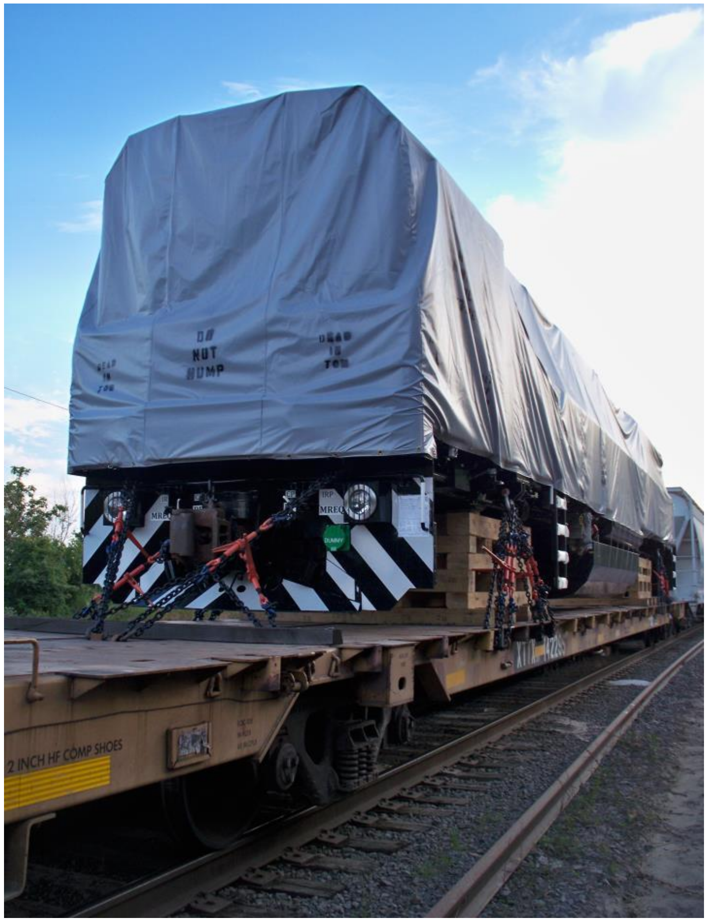
WAMX2707 [CBH008] on a flat car on a freight on Van Buren Sub Ok May 27th. END page 6 of 6.