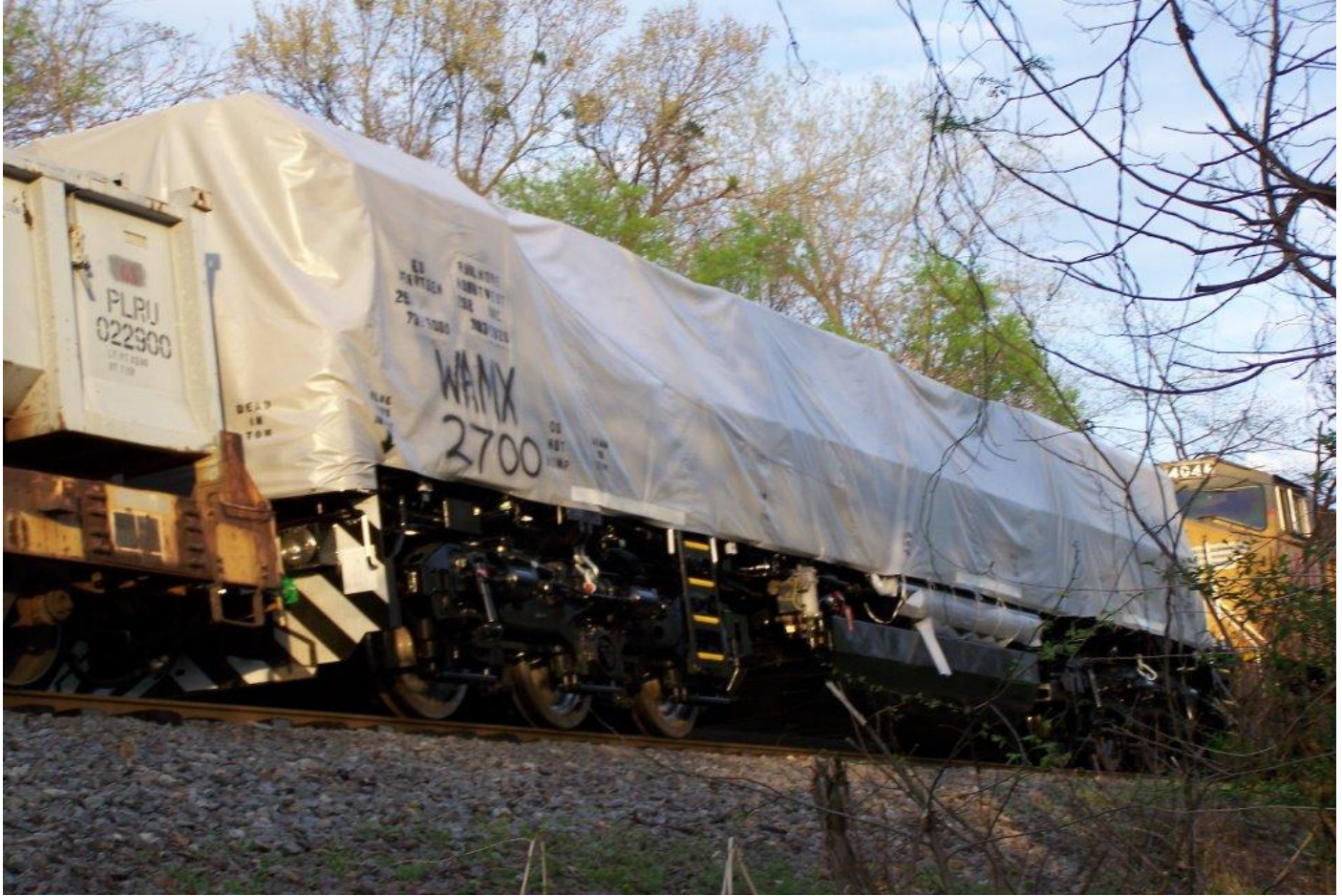
WAMX2700 [CBH001] at Diamond Oklahoma March 19th.