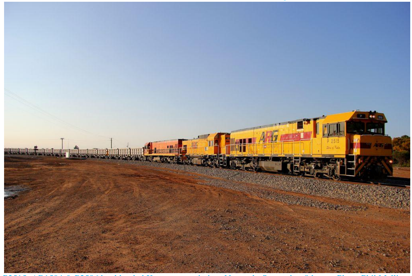
P2515, AB1504 & P2506 haul loaded Karara ore train into Narngulu September 8th.