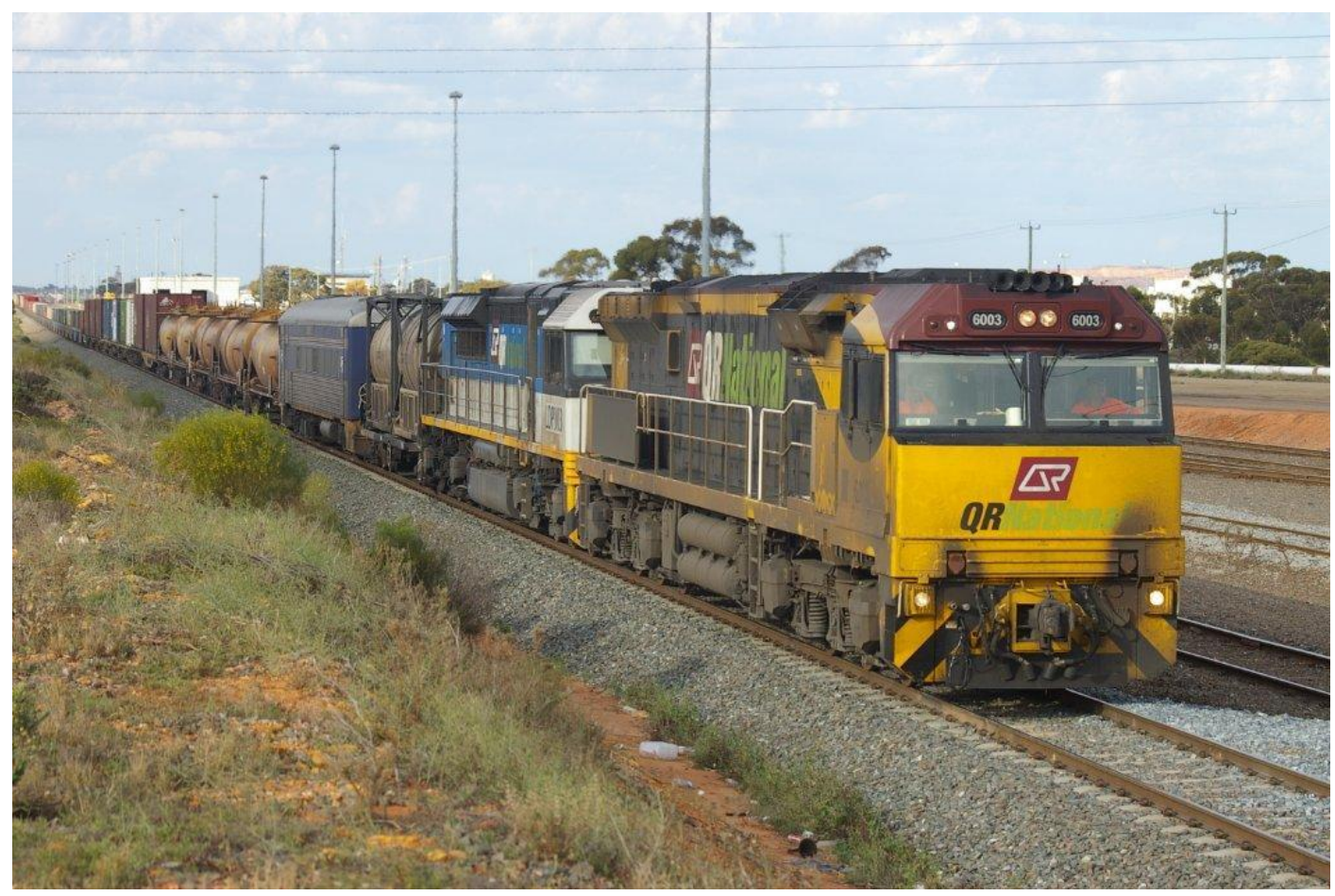
6003 & LDP003 with empty five Cook fuel tankers on 5MP1 West Kalgoorlie 15/9.