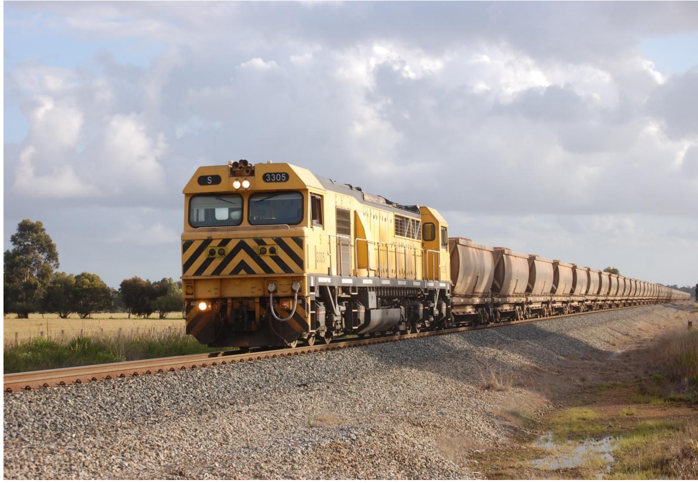
S3305 on loaded bauxite at North Dandalup September 18th.