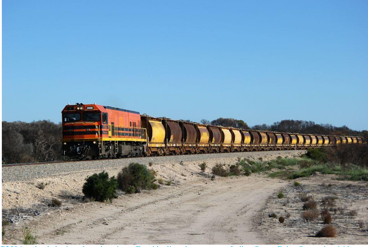
P2506 on loaded mineral sands train on Eneabba line about to cross Indian Ocean Drive September 16th.