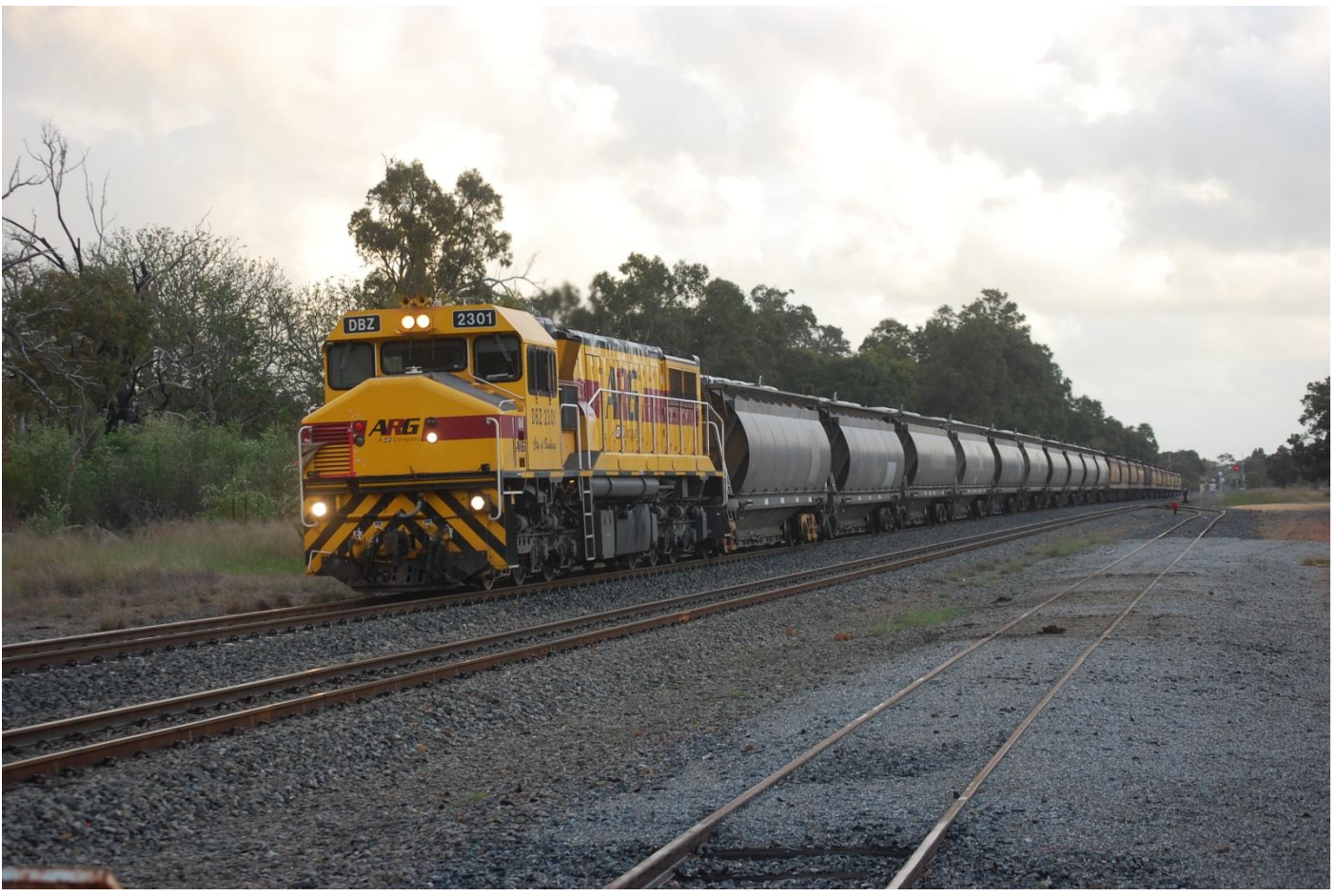
DBZ2301 on loaded alumina at Mundijong September 18th.