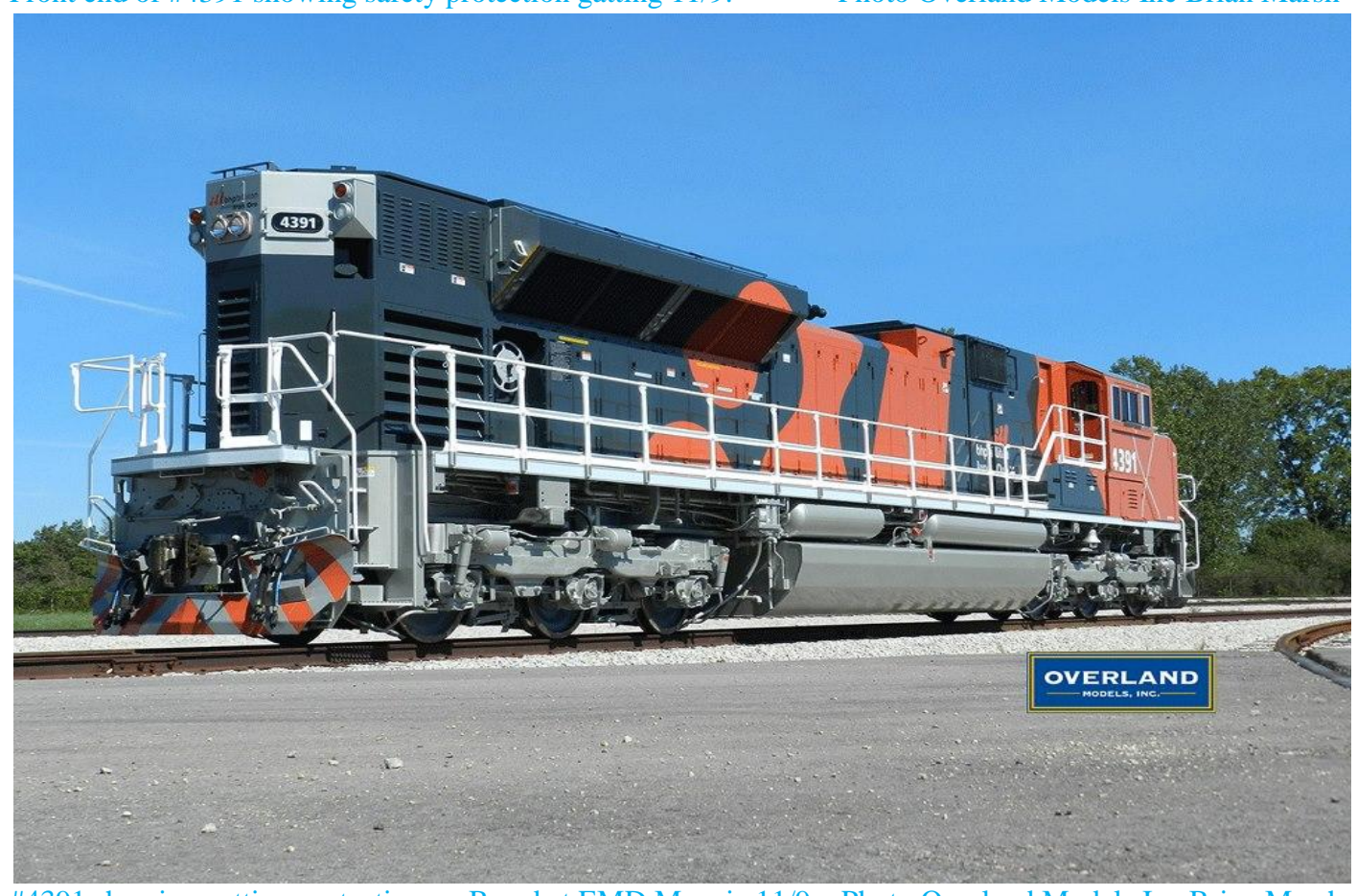
#4391 showing gatting protection on B end at EMD Muncie 11/9.