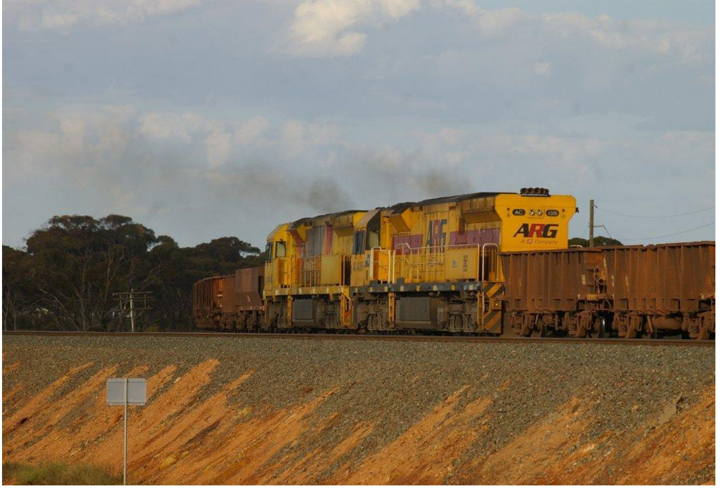
AC4306 & ACB4402 are DPU units on 7414 empty ore at Binduli September 15th.