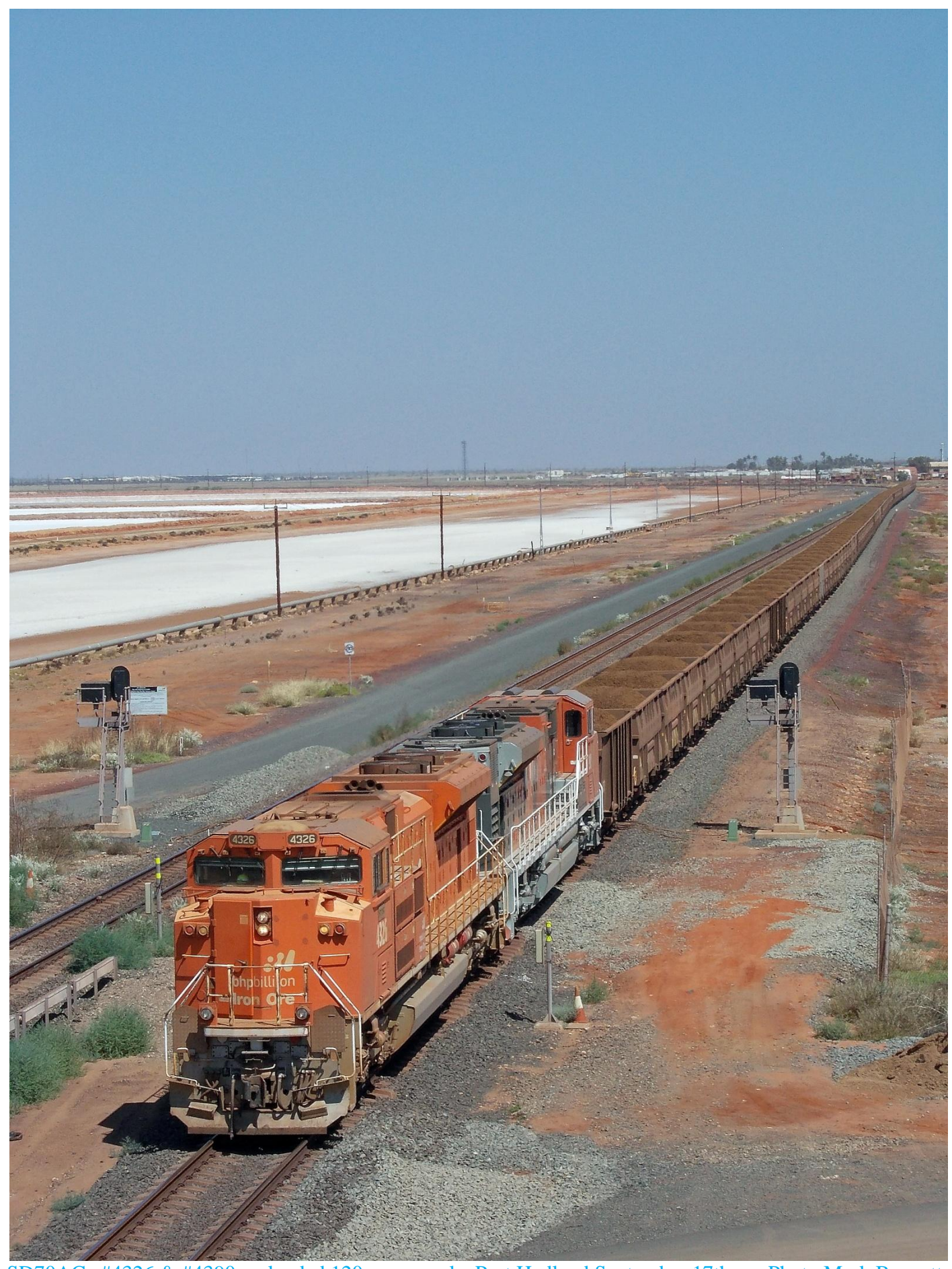
SD70ACe #4326 & #4390 on loaded 120 ore car rake Port Hedland September 17th.