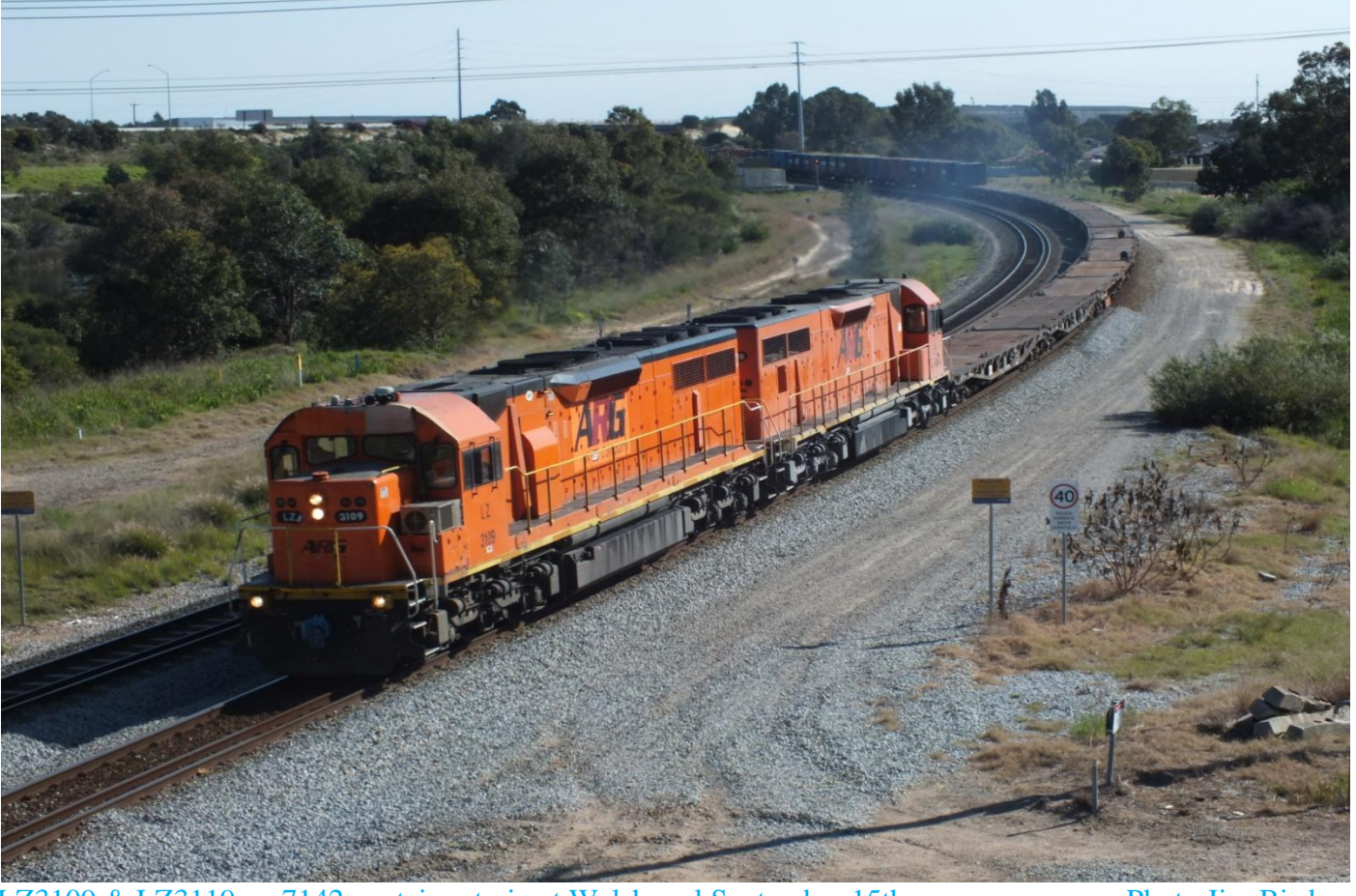
LZ3109 & LZ3119 on 7142 container train at Welshpool September 15th.