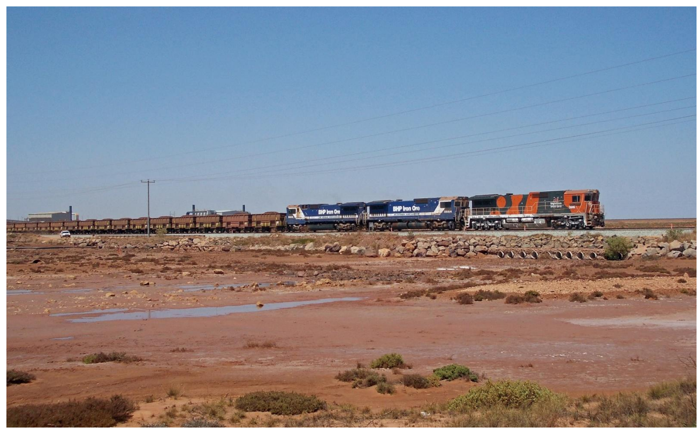
BHPBIO CM40-8M 5646, 5664 & 5666 haul loaded ore rake to Finucane Island 17/9.