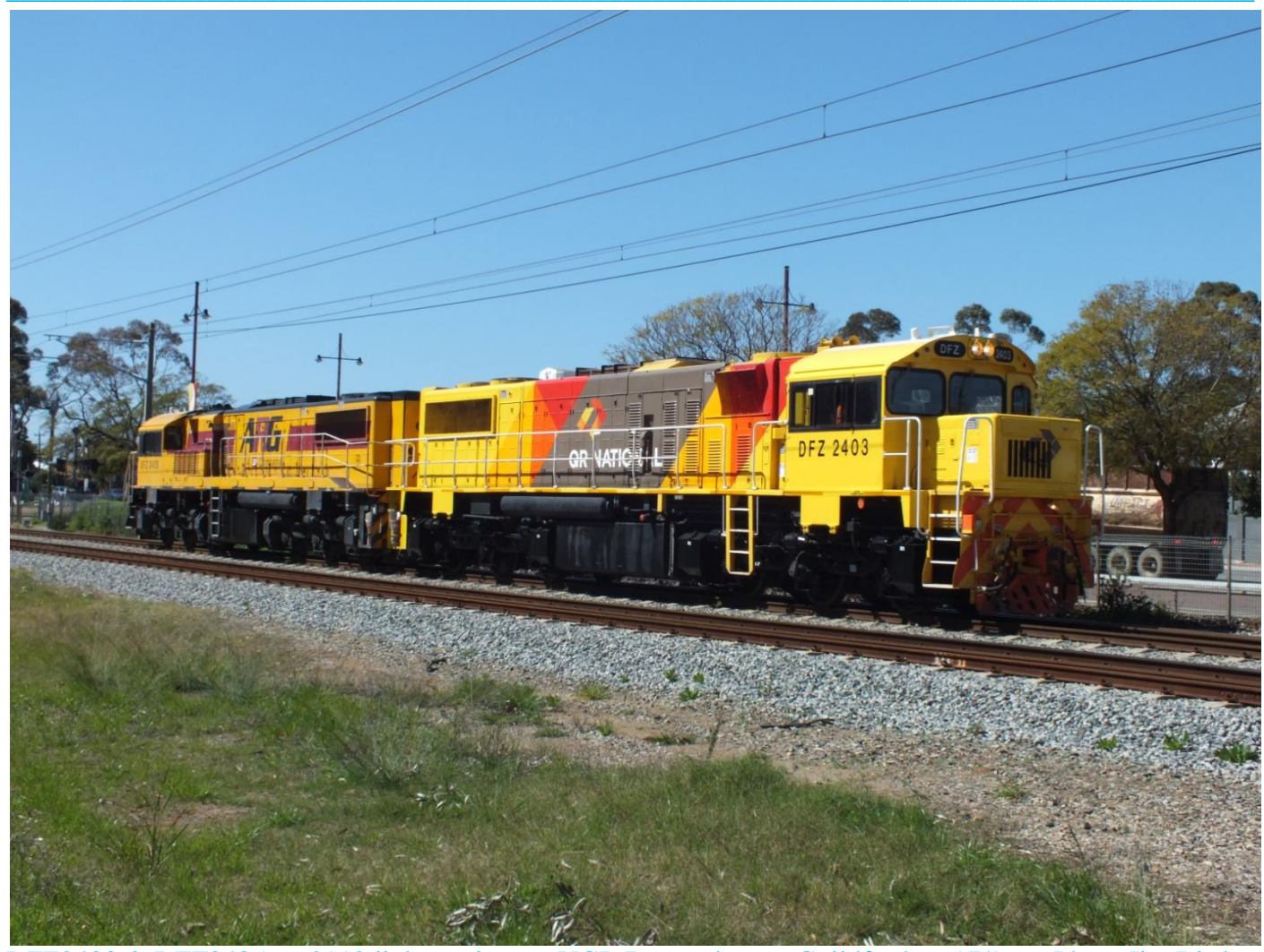
DFZ2403 & DFZ2405 on 2112 light engines to UGR Bassendean at Guildford on 17/9.

Overhaul of DB2311 is nearing completion with it having been fitted with Z trac traction upgrade package and is now DBZ2311 the final DB to be overhauled and upgraded. DBZ2311 has been repainted in QRN yellow livery its still at Forrestfield workshops.