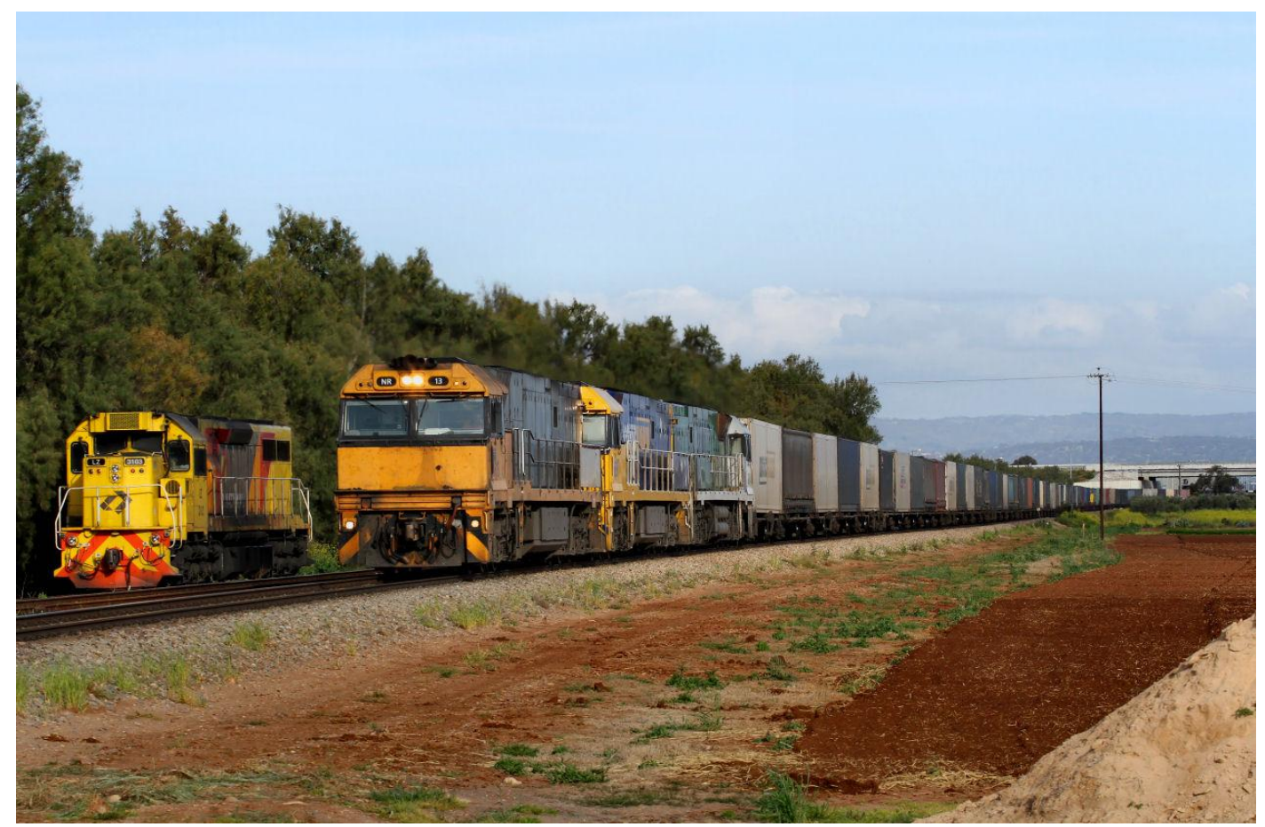
NR13, NR87 & NR84 on 7MP7 passing LZ3103 stabled Bolivar Loop SA 14/9 after being detached owing to badly skidded wheels by 5MP1 QN intermodal that was hauling it back to WA.