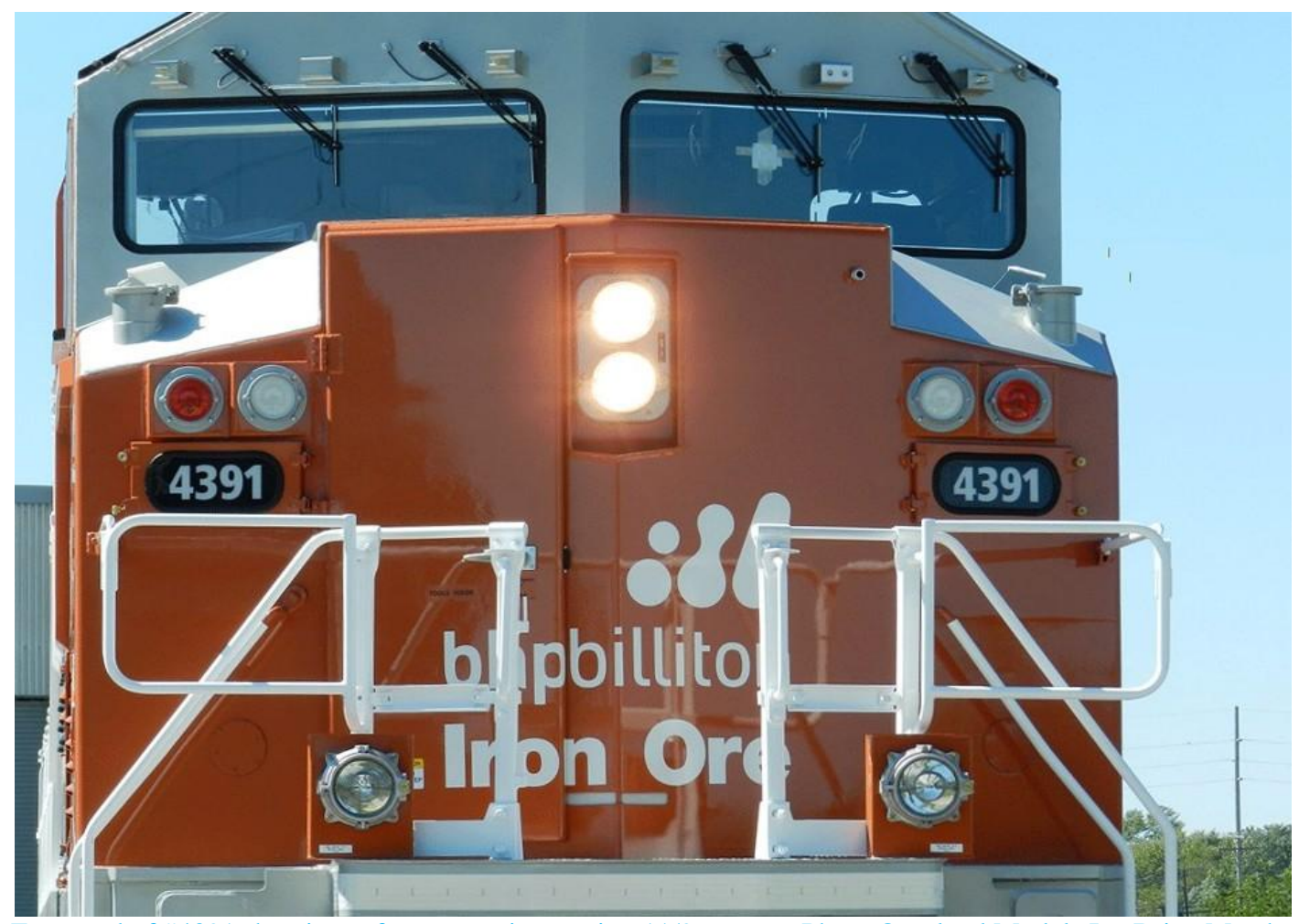
Front end of #4391 showing safety protection gatting 11/9.