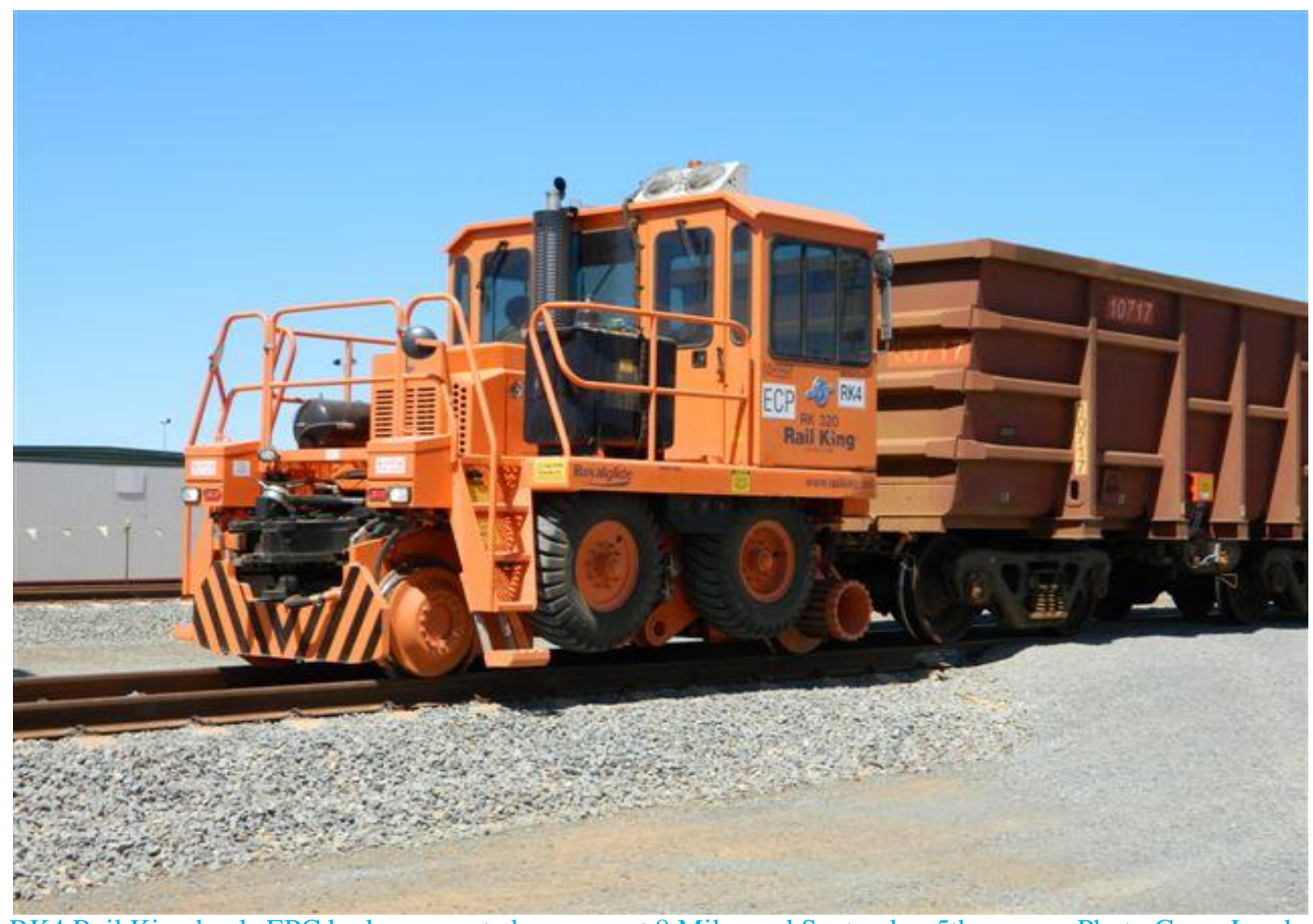
RK4 Rail King hauls EPC brake converted ore cars at 8 Mile yard September 5th.