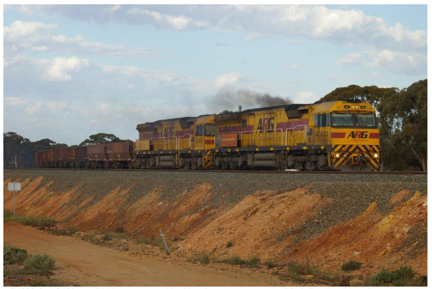
AC4302 & AC4301 on 7414 empty ore with old and new ore cars types Binduli 15/9.