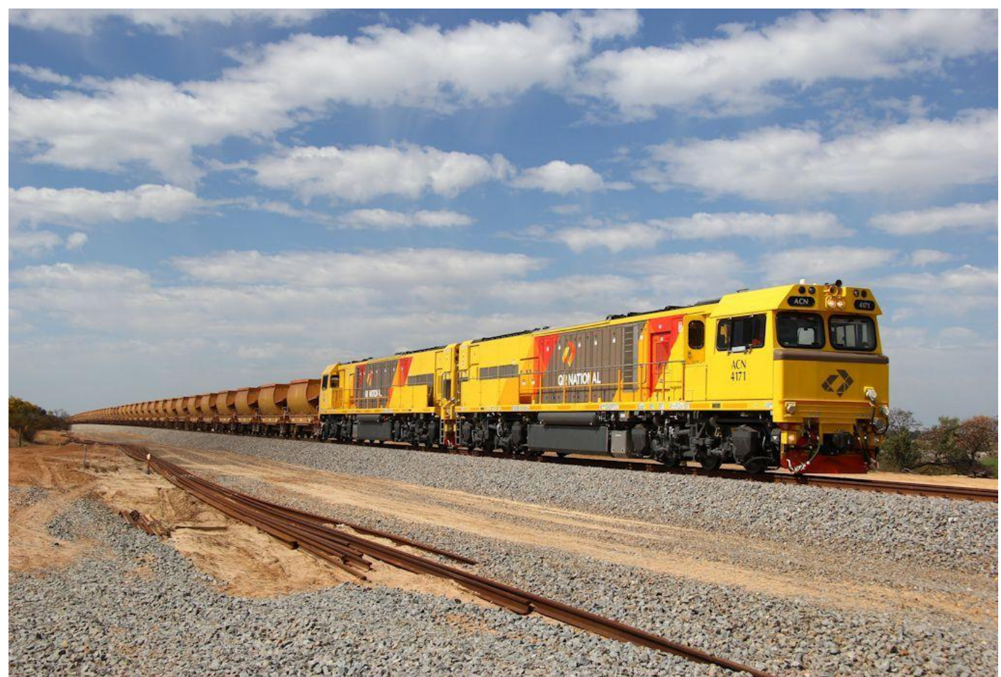
ACN4168 & ACN4168 on Mt Gibson ore train at Kojarena September 17th.