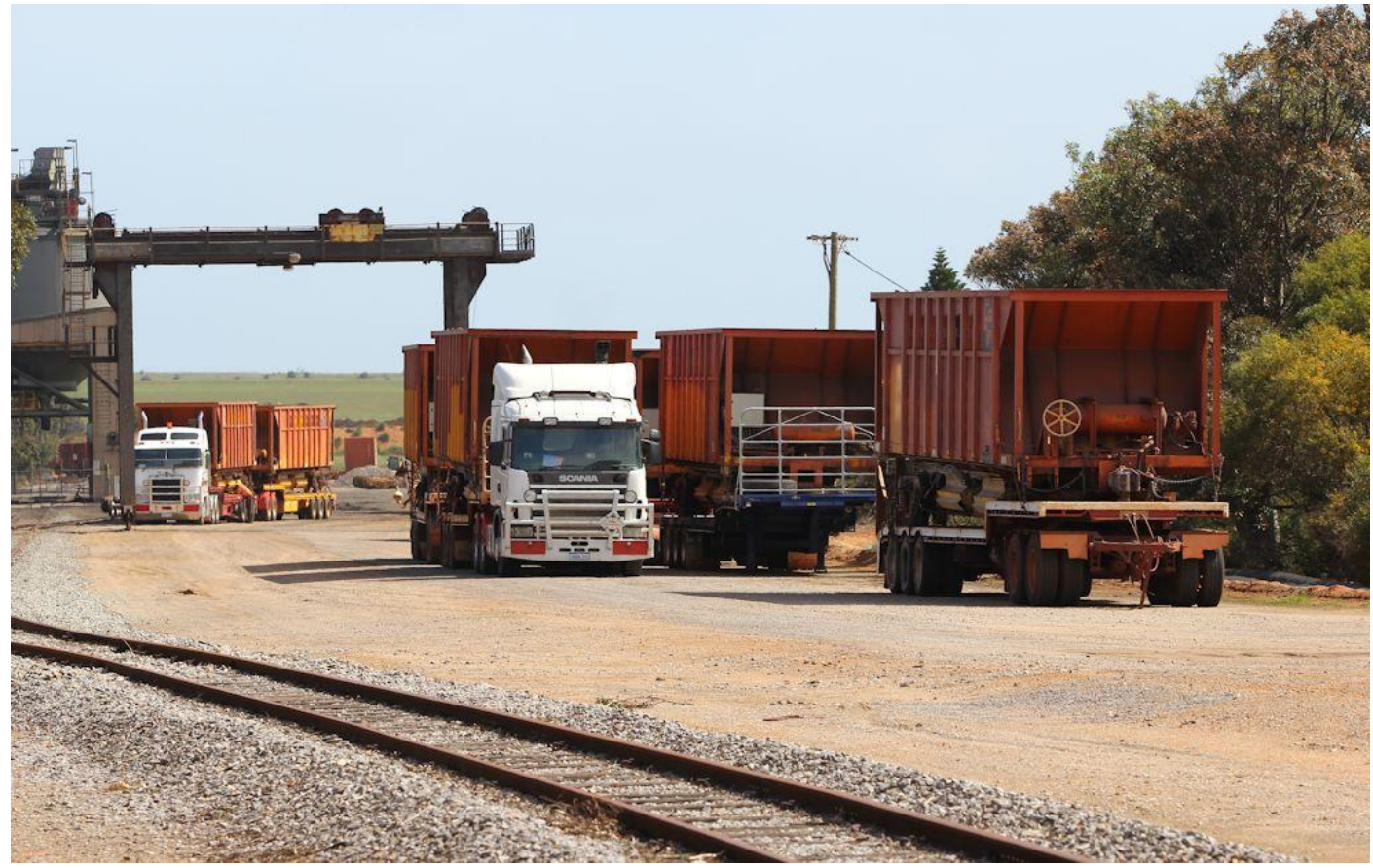
Some CFCLA CHAY 2xpack hoppers were converted into ballast wagons for use on Mid West upgrading here loaded on semi trailers ready to be hauled out at Narngulu at their end of use 4/9.