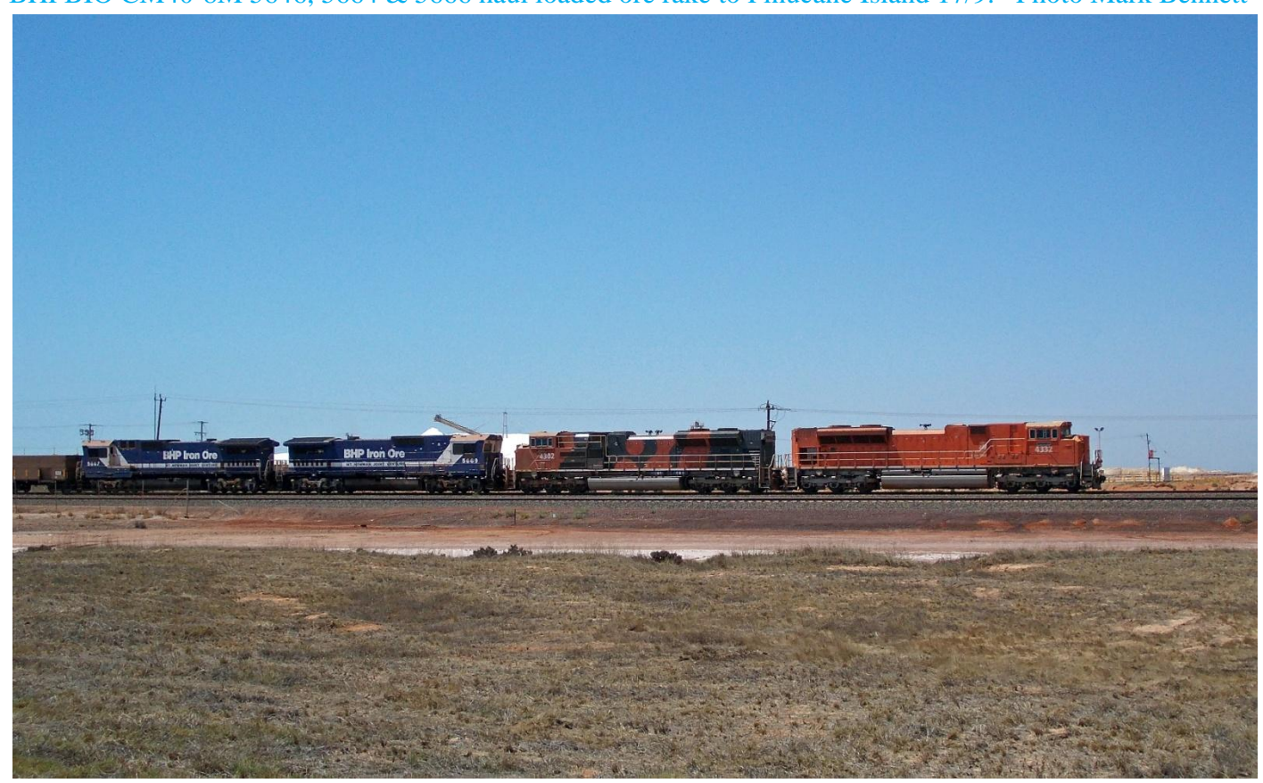
4332, 4302, 5669 & 5667 departing Port Hedland with empty ore train to Mt Newman where the two CM40-8Ms will be detached for use on Mt Newnan shuttle trains September 17th.

SCT014 on hire to Watco was hauled out dead attached to Adelaide on SCT 3PG1 September 18th for repair and maintenance that also had refurbished GWA crew car ADFY4 [ex BRJ2] attached.