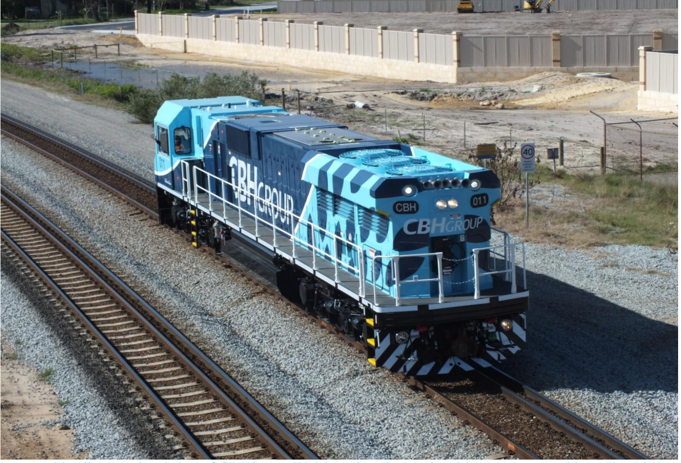
Long end leading overhead shot of CBH011 at Welshpool on September 7th.