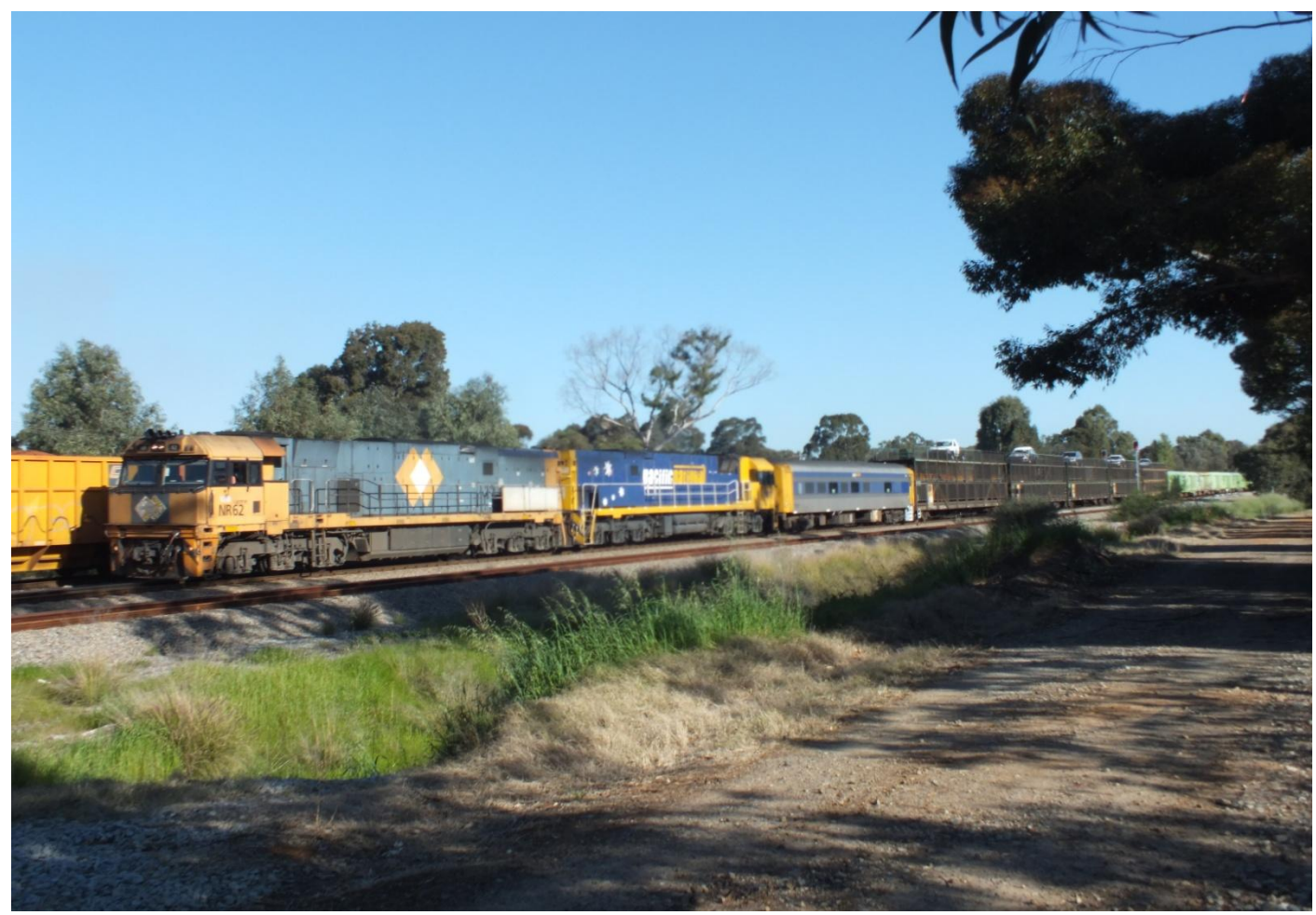
NR62 still with National Rail diamonds & NR11 on 7PM5 Woodbridge September 15th.