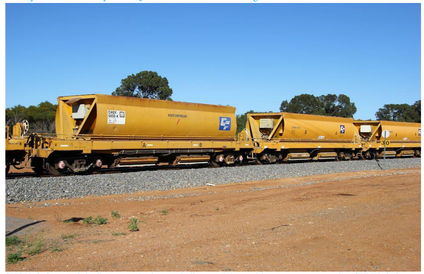
CHOY6050 was originally on standard gauge ballast work here with narrow gauge version CHNY6013 on now combined single ballast fleet at Narngulu September 15th.