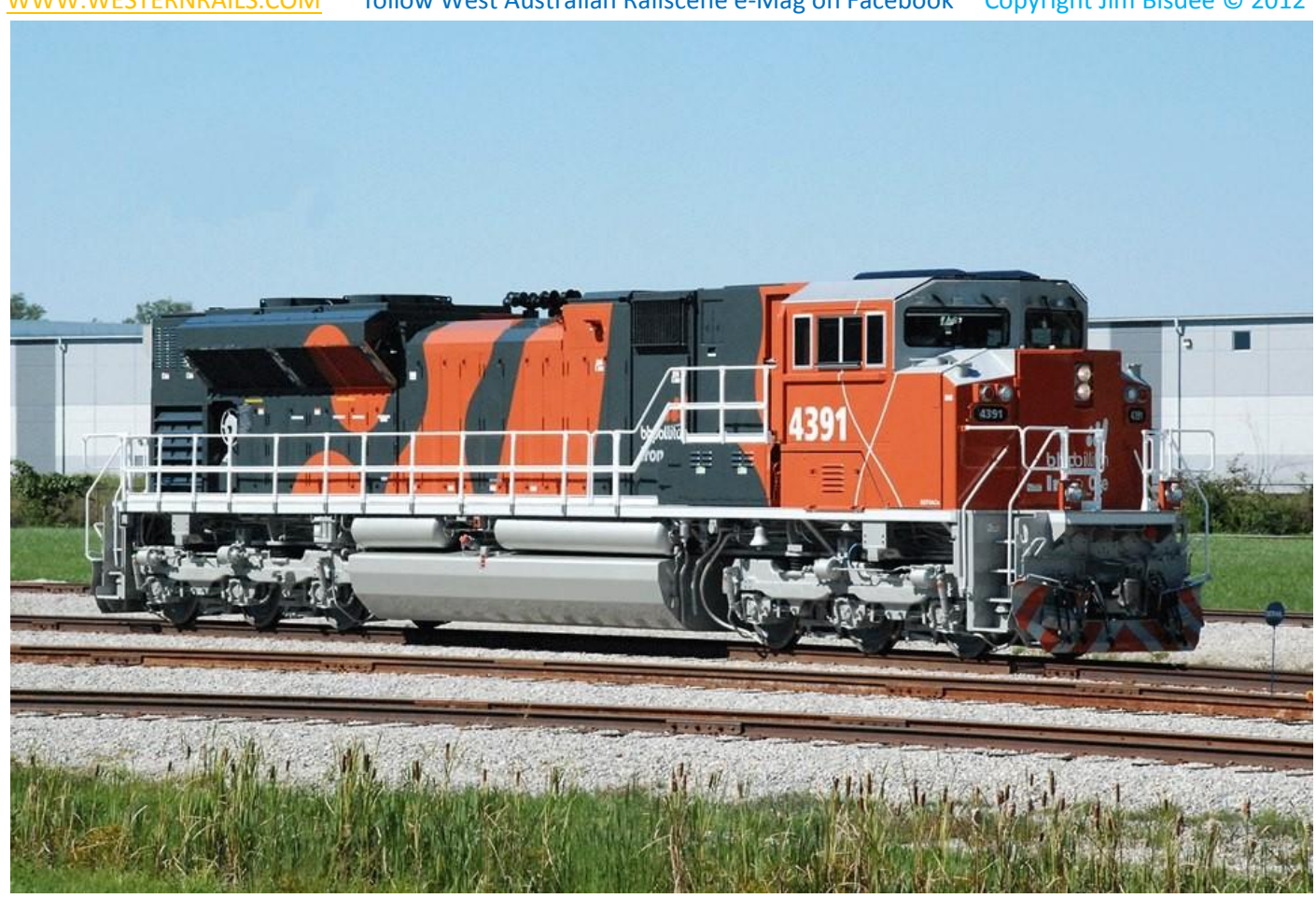
4391 first of the latest BHPBIO SD70ACe locomotive order to be completed at EMD Muncie Indiana plant undergoing tests on September 11th.

West Australian Railscene e-Mag is published weekly by Jim Bisdee on rail happenings on West Australian Railroads WWW.WESTERNRAILS.COM follow West Australian Railscene e-Mag on Facebook Copyright Jim Bisdee © 2012