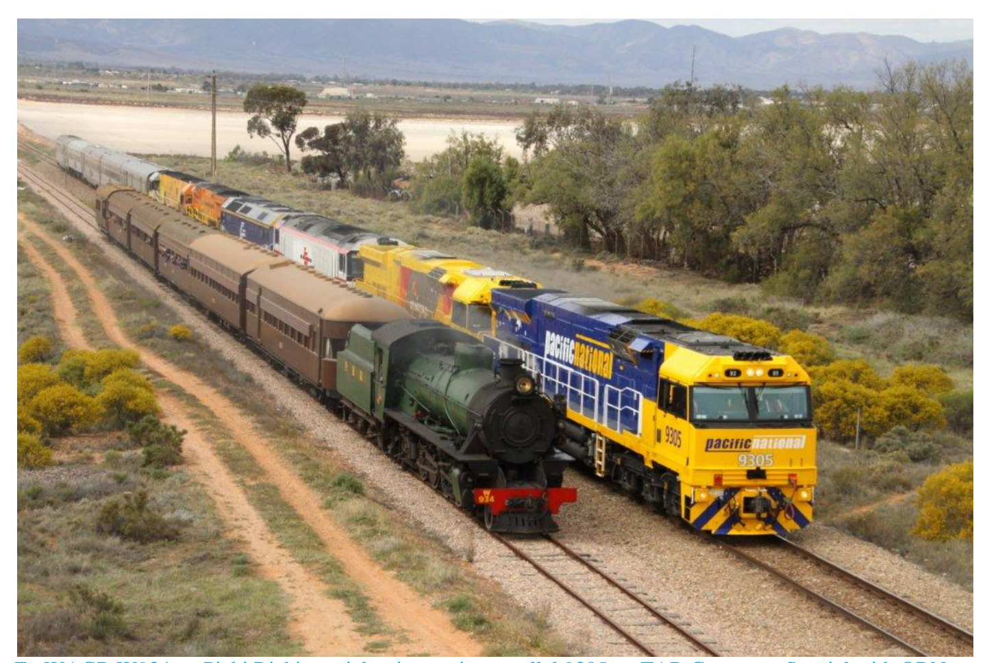
Ex WAGR W934 on Pichi Richi special train running parallel 9305 on TAR Centenary Special with QRN 6022, CFCLA G512, SCT CSR004, GWA GWU004 & P/N NR18 Port Augusta 14/9.