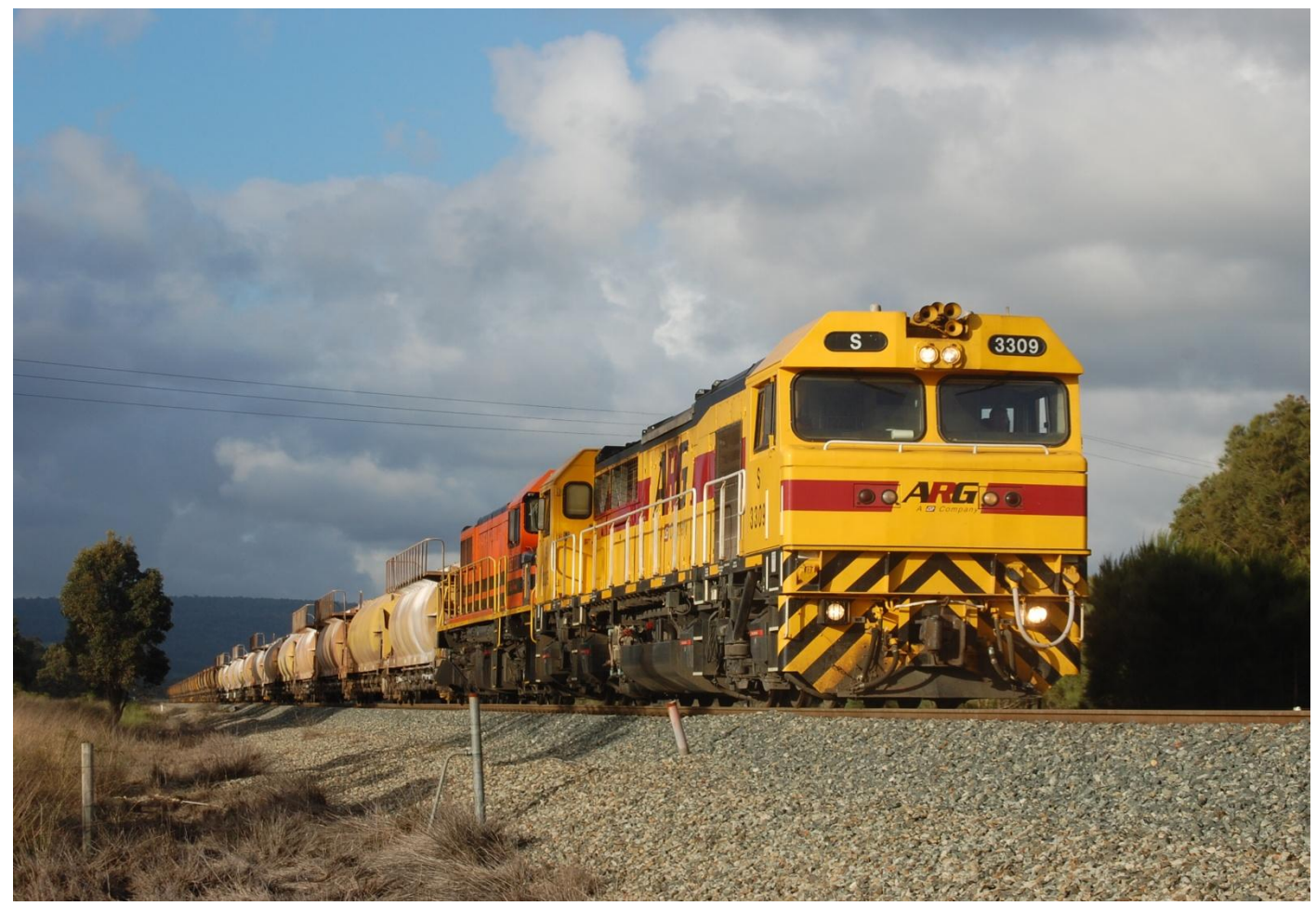
S3309 & DBZ2310 on 3271 lime empty coal at North Dandalup September 18th. Photo Brendan Cherry