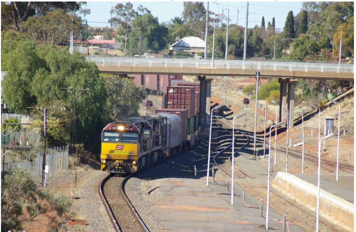
6003 & 6007 with in line fuelling on double stacked 5MP1 QR National intermodal going under Maritana St Bridge in central Kalgoorlie September 29th.