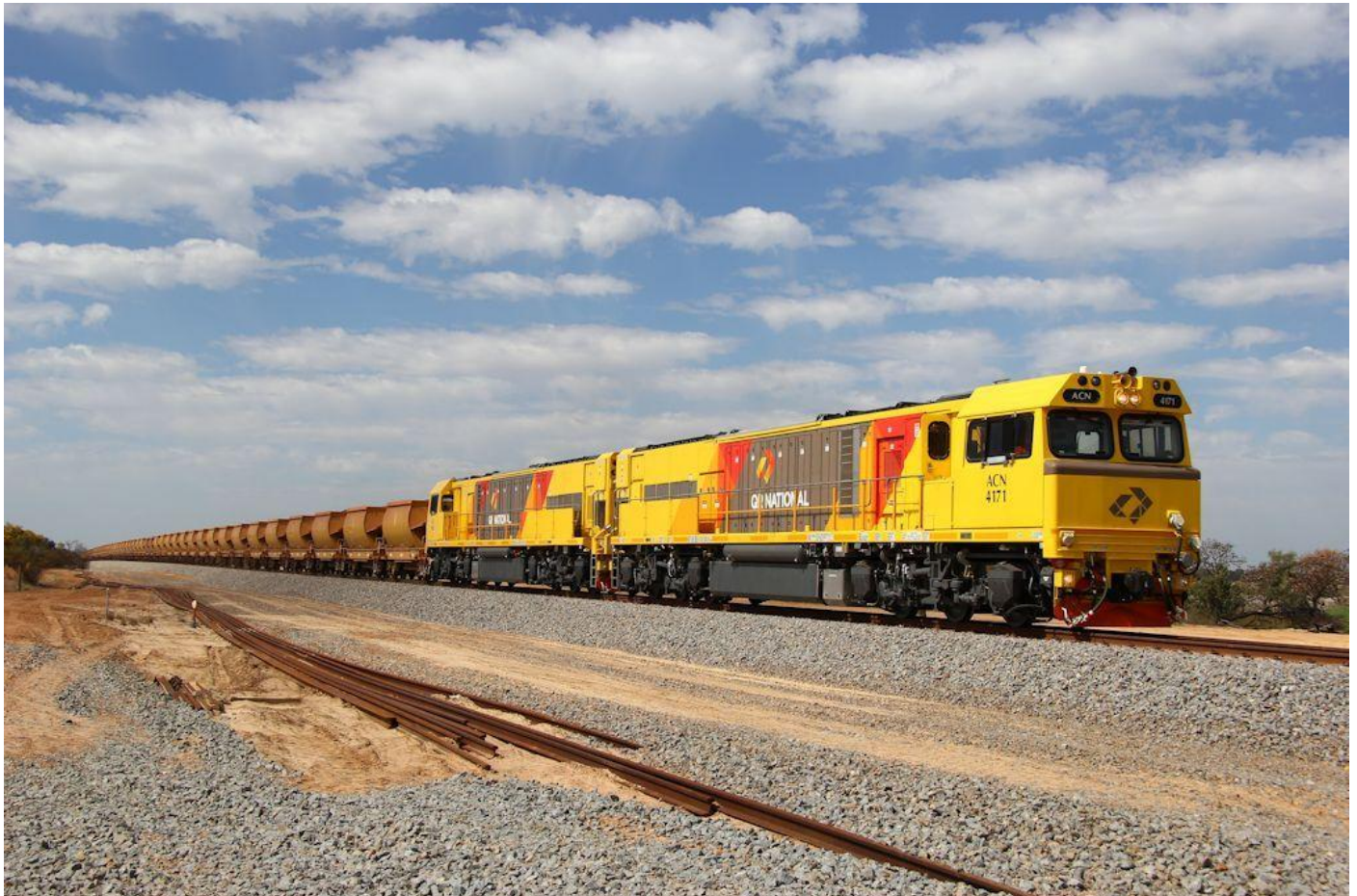
ACN4171 & ACN4168 on Mt Gibson ore train at Kojarena on September 17th.