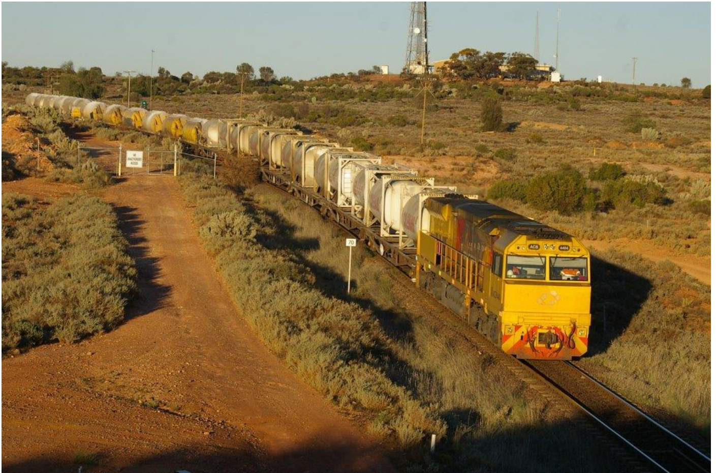
ACB4404 on 6C74 Parkeston shunter with empty cement/lime wagons at Kalgoorlie September 28th.