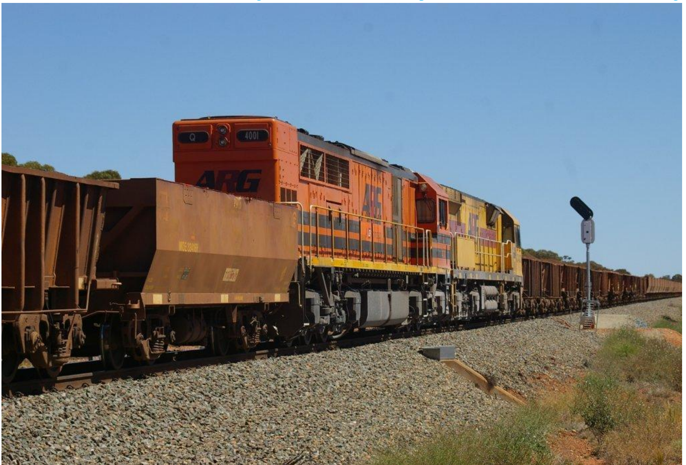
Q4001 & AC4303 remote DPU units on 7415 ore train at Binduli September 29th.