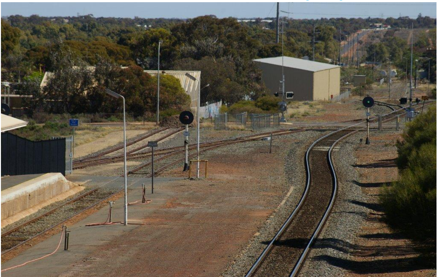
West end of Kalgoorlie Station with Prospector Dock behind fence on left, connection to Kalgoorlie loco track centre right with connections of Kalgoorlie to left 29/09.