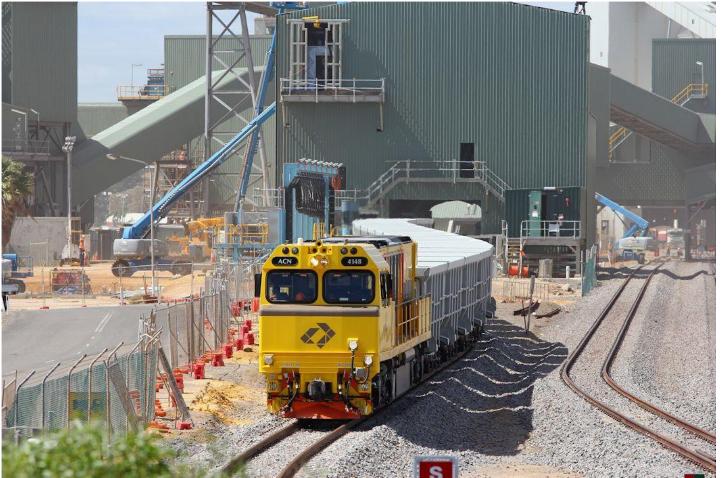
ACN4148 on test train testing Karara Mining car dumper Geraldton Port September 3rd.