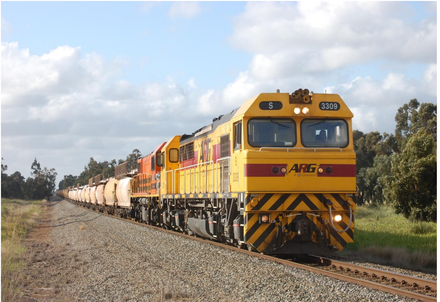
S3309 & DBZ2310 on 3271 lime empty coal train at Keysbrook September 18th.