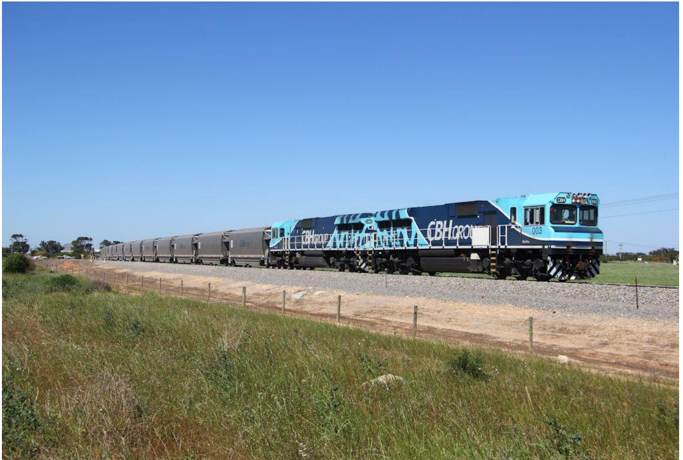
CBH003 & CBH005 on Watco grain at Narngulu September 16th.