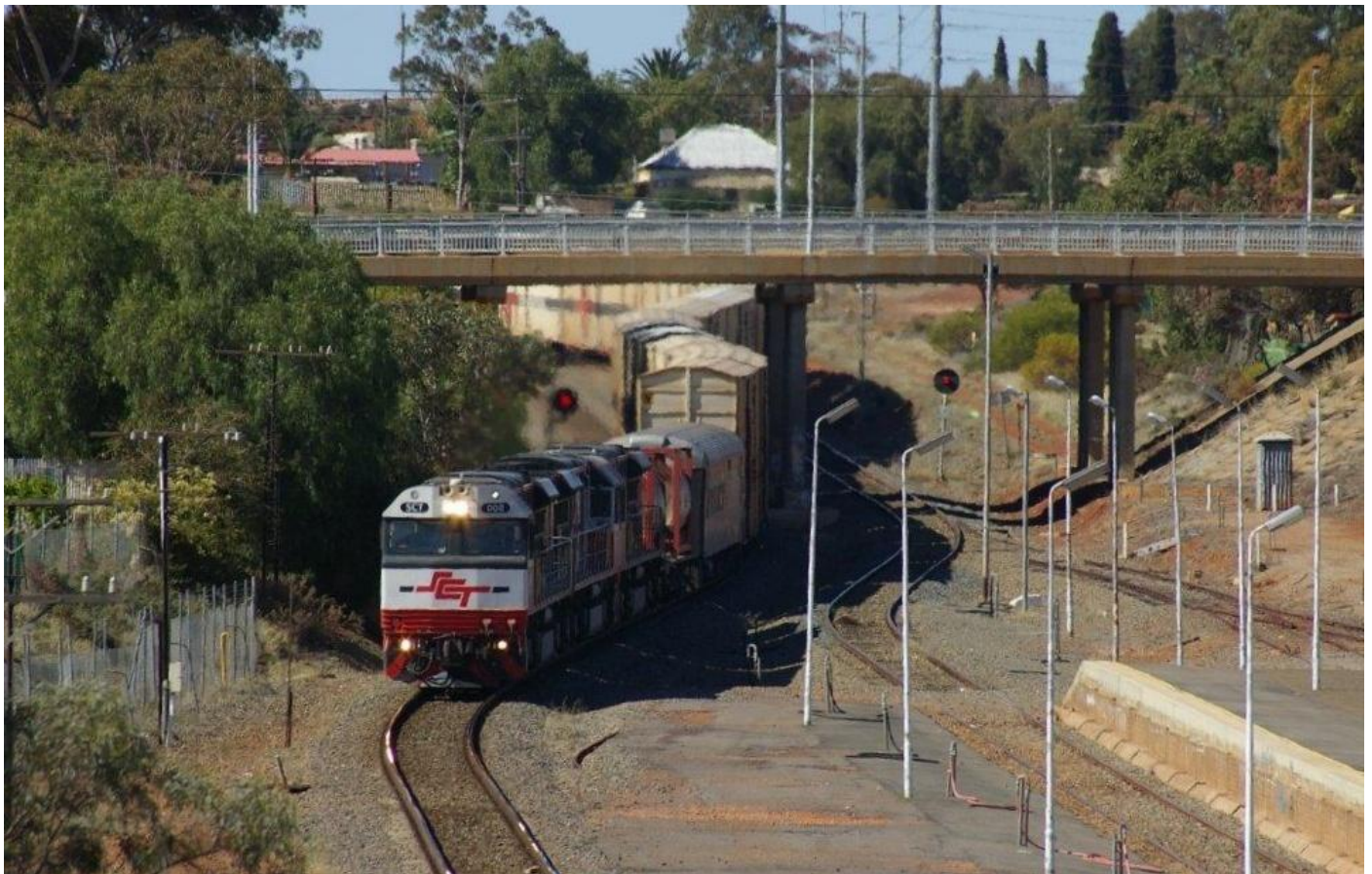
SCT008, SCT006 & SCT014 on 5MP9 SCT freight going under the Maritana Street Bridge showing the massive size of the SCT Hi Cube vans and the foresight of building the EGR with high clearances 29/09.