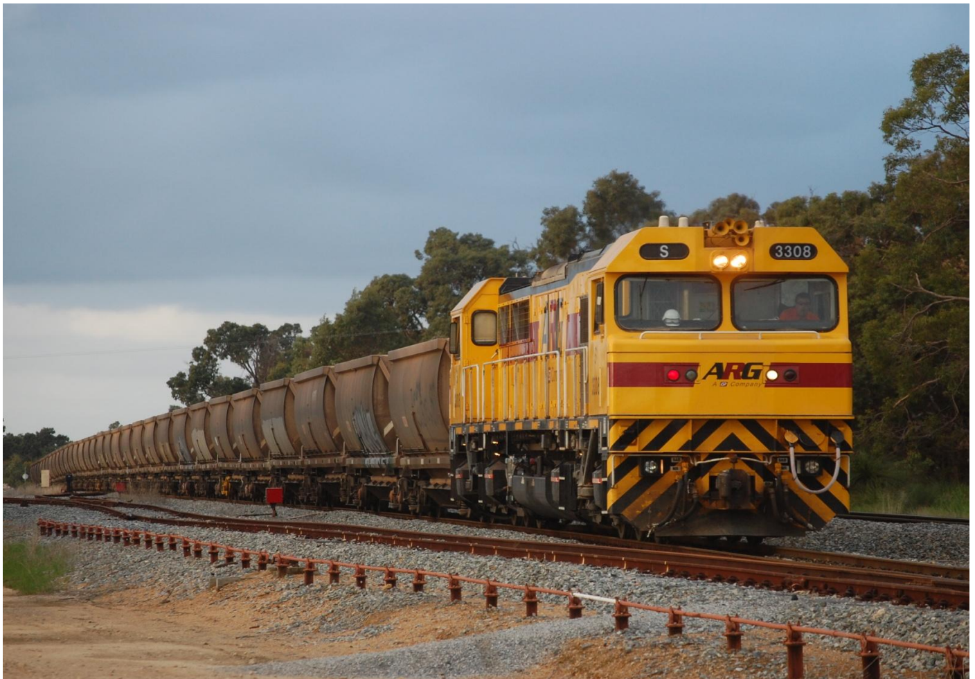
S3308 on 3953 empty bauxite train at Keysbrook September 18th.