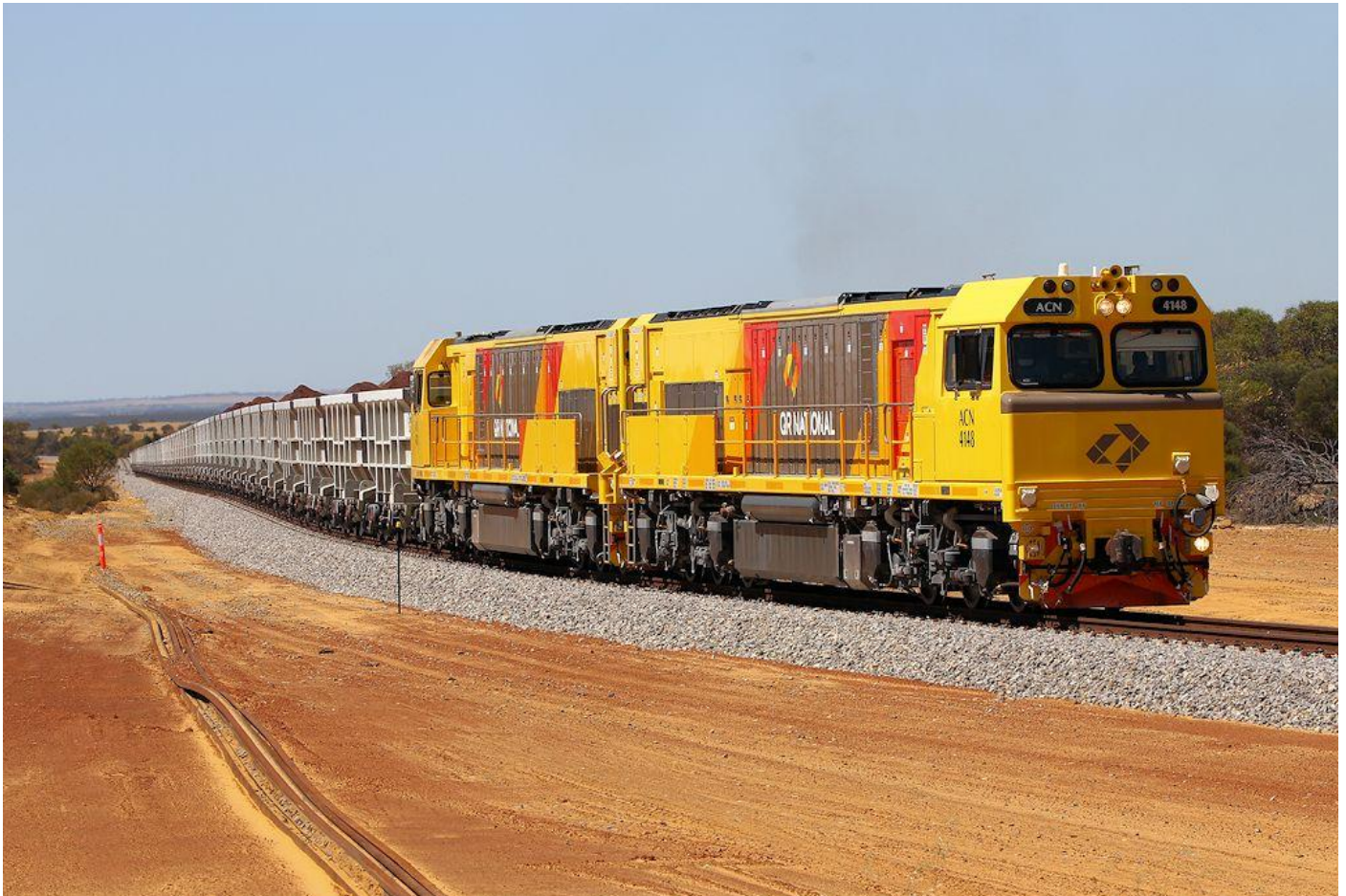
ACN4148 & ACN4151 on Karara Mining ore train at Nola East September 23rd.