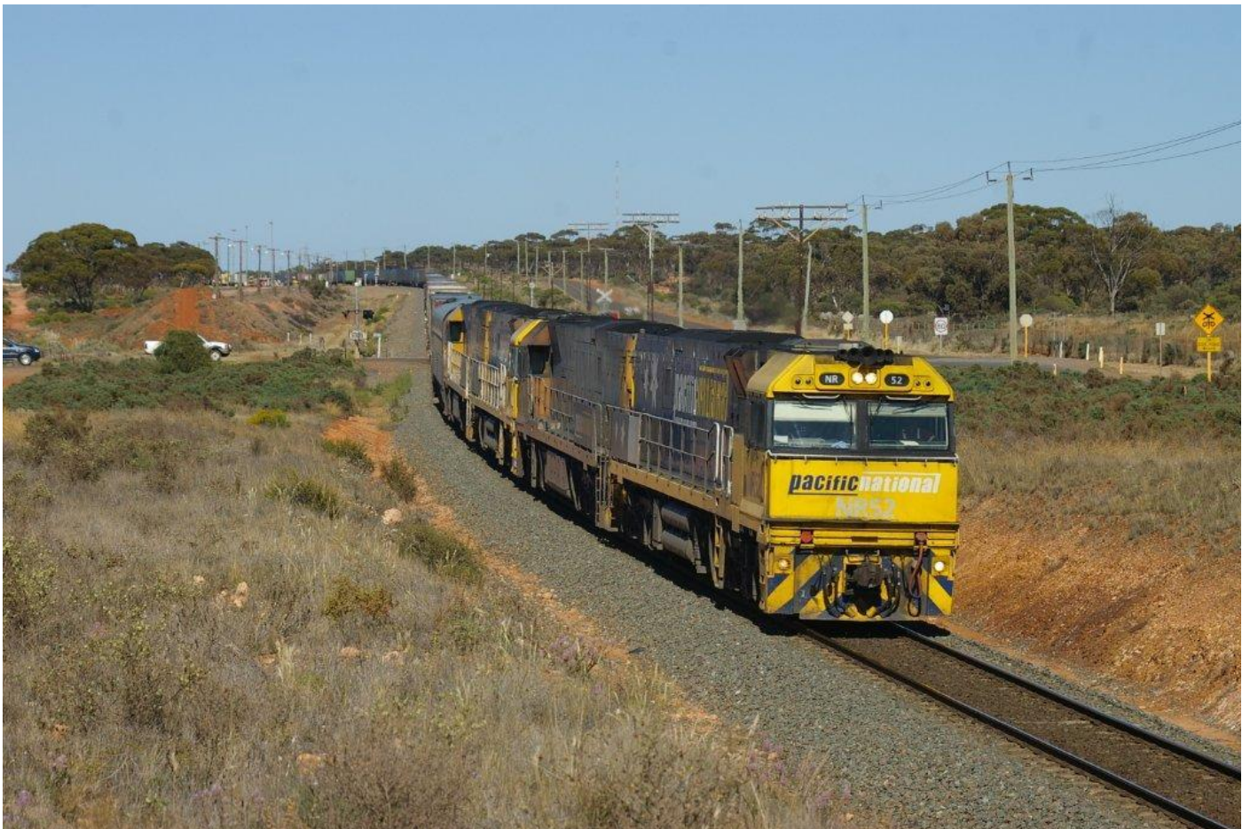
NR52, NR63, dead NR110 & NR116 on 6PM7 express West Kalgoorlie 29/09.