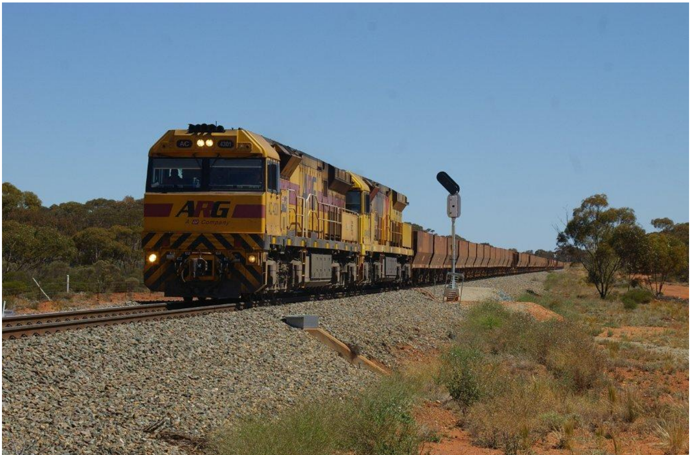
AC4301 & ACB4405 on 7415 ore at Binduli September 29th.