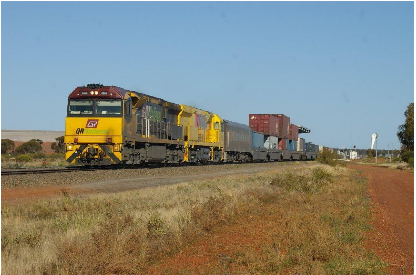
6008 with 6022 the first of the new 6020 class locomotives to run to WA arrives on 6MP1 QRN intermodal at Parkeston on September 23rd.