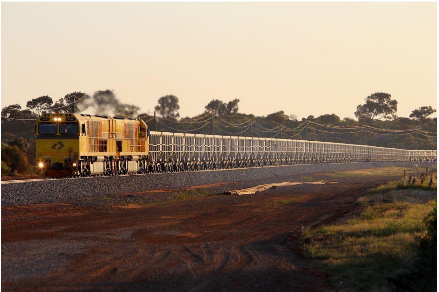
ACN4144 & ACN4171 on empty Karara Mining ore train at Narngulu East 23/09.

SCT014 was hauled back to WA on SCT freighter 5MP9 behind SCT008 & SCT006 following service and maintenance September 29th to resume short term hire on Watco grain trains.