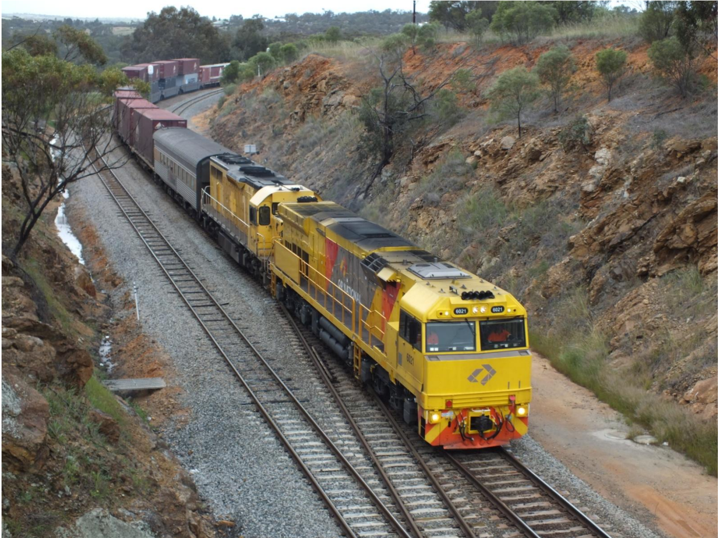
New QRN locomotive 6021 on its first trip to WA leads L3108 on very late 2MP1 at Great Eastern Highway Northam Bypass Bridge at entrance to Avon Yard September 27th.

Gindalbie Metals Karara Mining new iron ore export terminal at Geraldton was opened by WA Treasurer Mr Buswell in a ceremony at the Geraldton port held on September 18th. Karara Mining have now completed and commissioned the rotary car dumper at Geraldton port with test loaded ore trains having been run to assist with its commissioning.