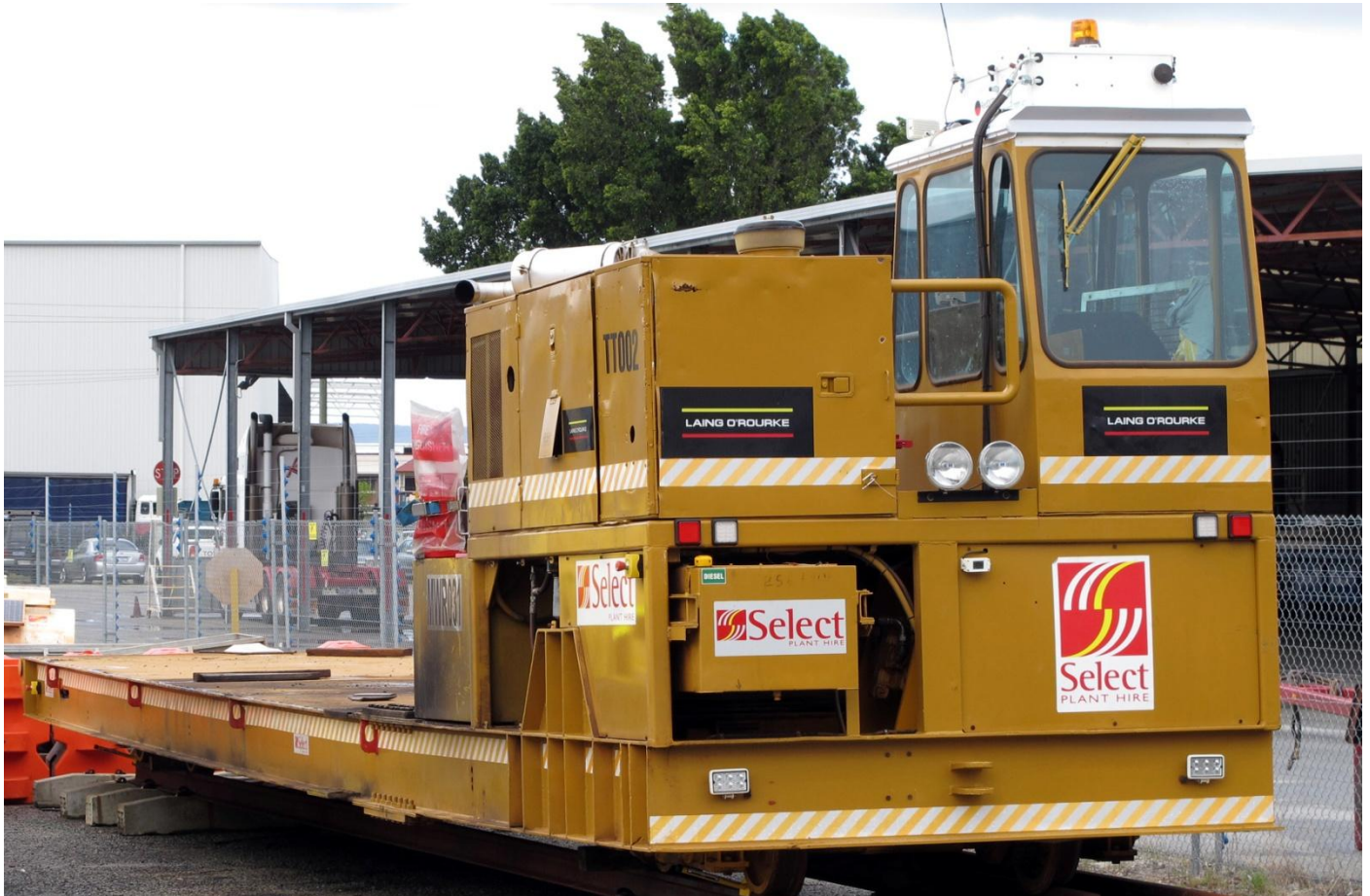
Select Plant hire track Machine TT002 in a Kewdale Transport Yard with a lot of track work now completed this will become a more common site as these machines are returned 27/09.