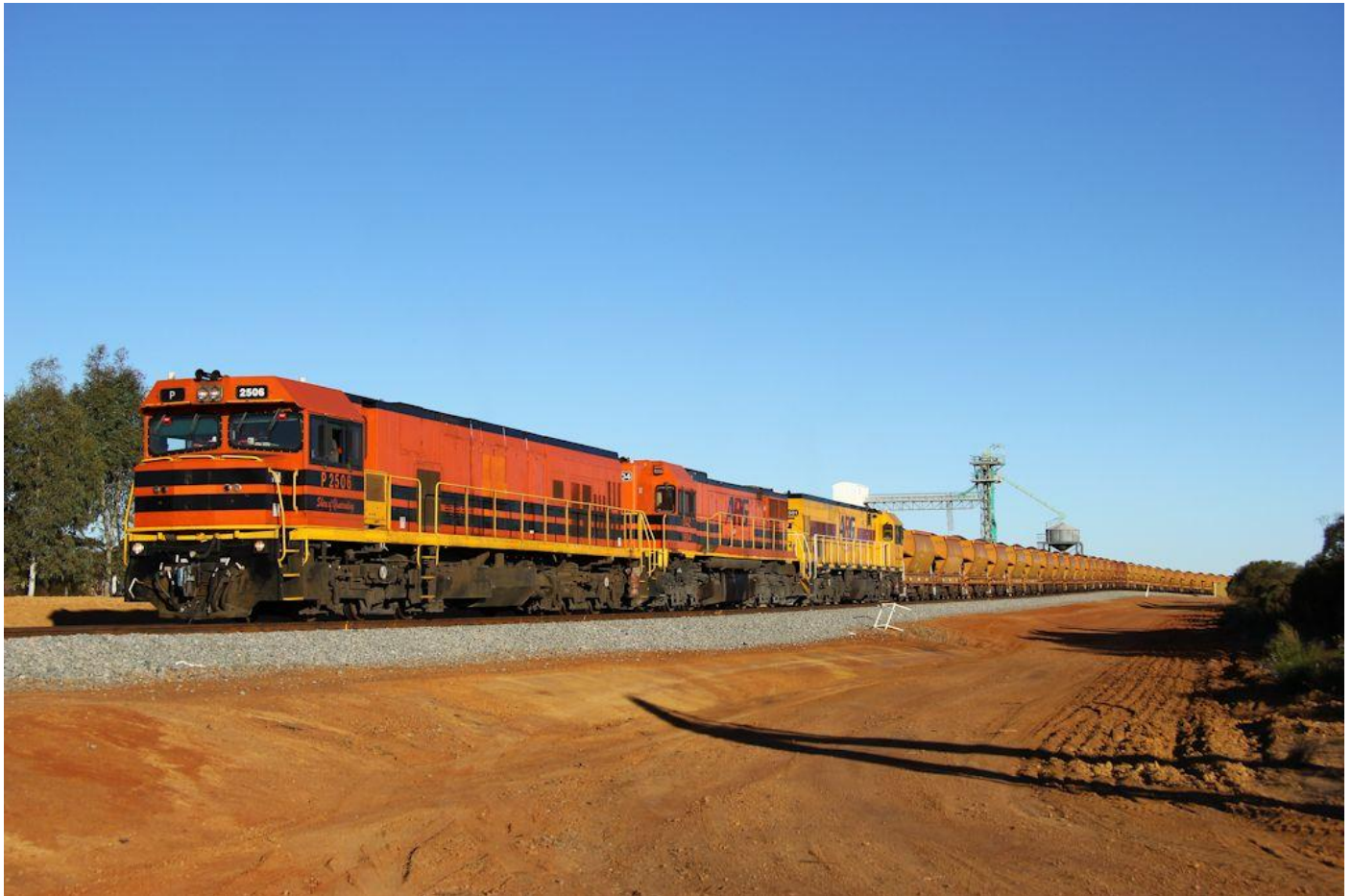
P2506, DAZ1904 & P2501 on Mt Gibson Perenjori ore train at Canna September 29th.