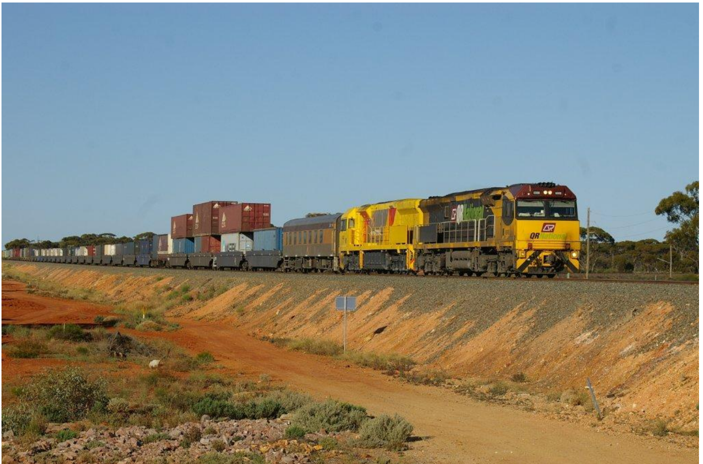
6008 & 6022 run 6MP1 QRN intermodal at Binduli September 23rd.