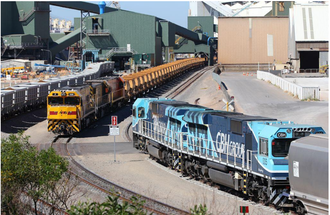
P2508, DA1906 & P2516 on Mt Gibson ore train unloading at Geraldton Port with CBH003 & CBH005 on Watco grain entering the port with loaded Karara Mining ore cars at Dumper 16/09.

Upgrade and improvements to Queens Park Station on the Armadale line have commenced that will see improved and modernised facilities being installed to replace the outdated brick shelters in use.