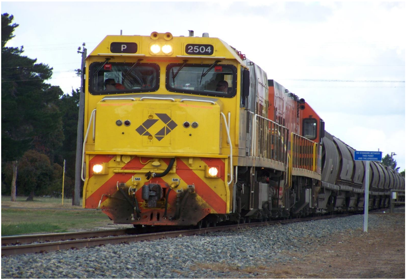
P2504 & P2507 on QRN grain train at Tambellup October 23rd.