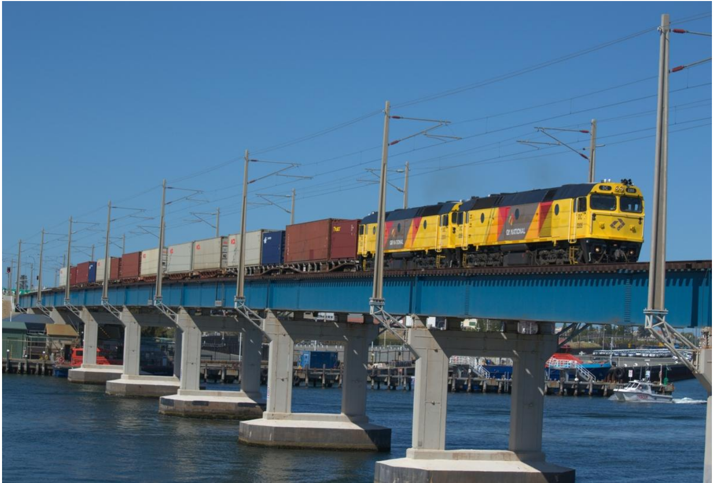
DC2205 & DC2213 on 7142 container train under the wires crossing Swan River at east end of Fremantle Harbour on its way to North Port Container Terminal October 6th.