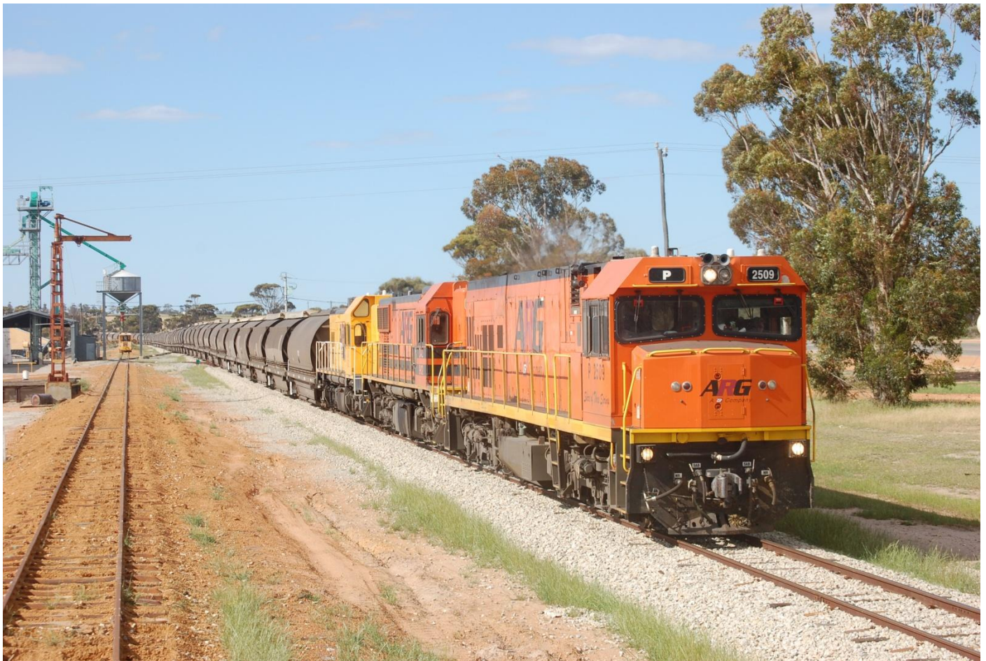
P2503, DAZ1902 & AB1502 on 4342 empty QRN grain at Cadoux October 3rd.