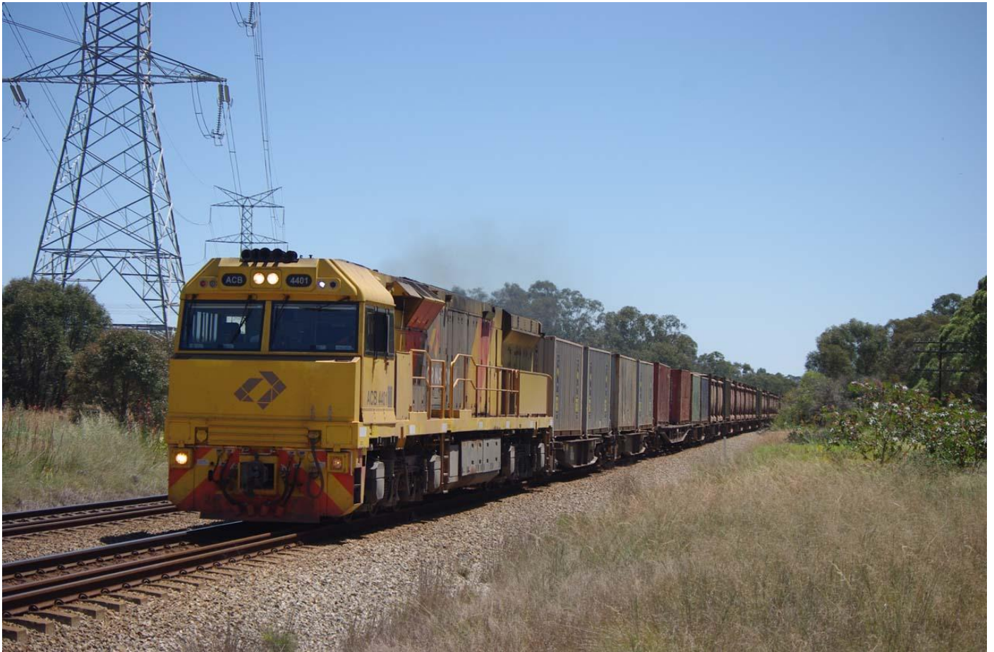
ACB4401 on 6430 empty sulphur train at Middle Swan October 20th.