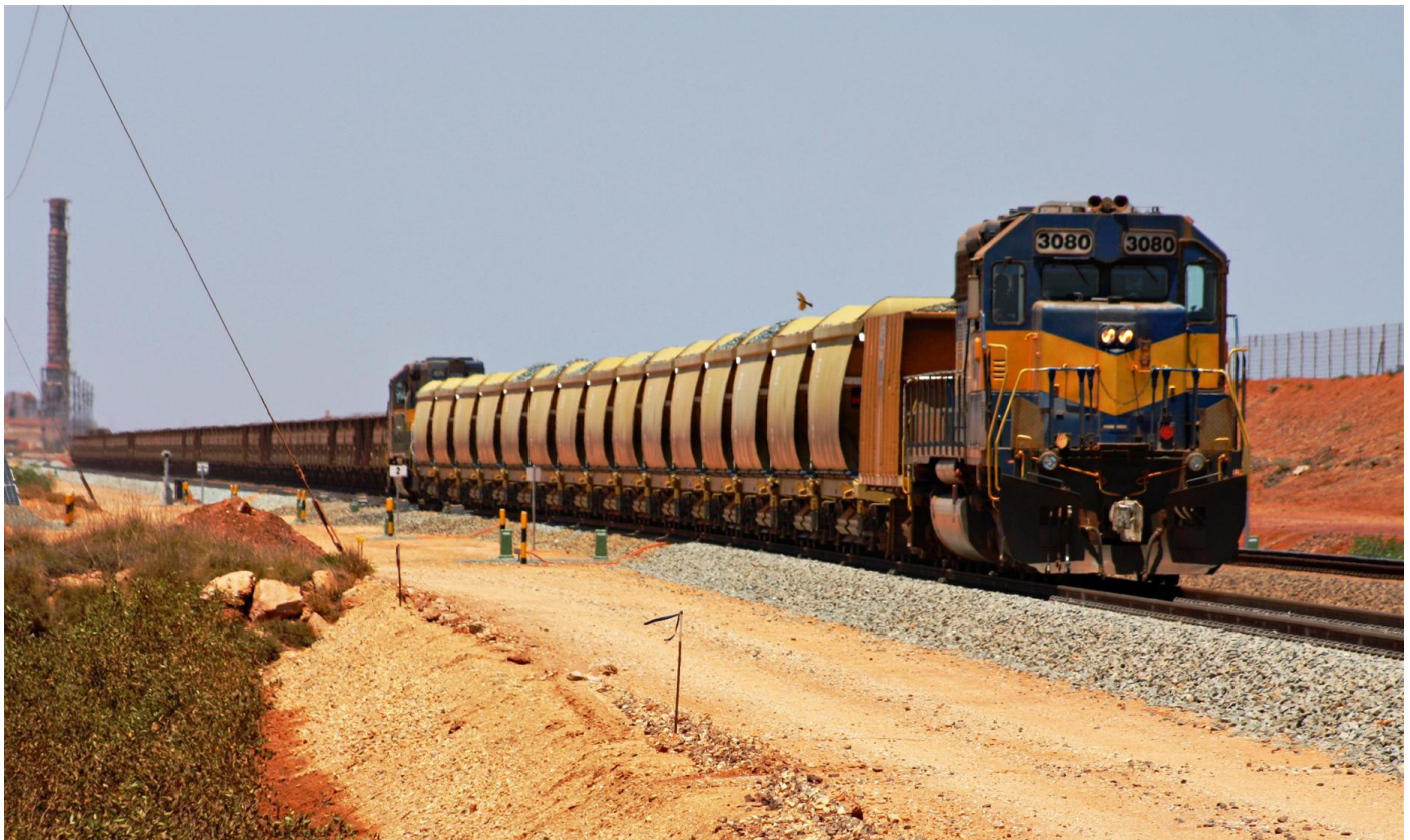
SD40R 3080 & SD40R 3079 now only used on construction trains, top and tail on ballast train at Finucane Island October 17th as part of line duplication being undertaken.