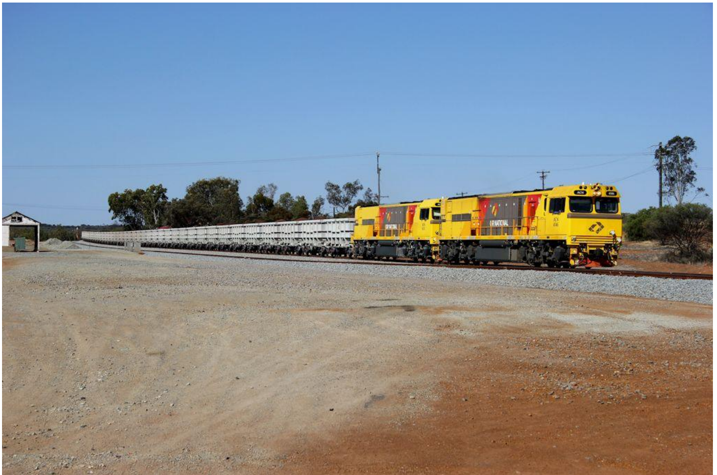
ACN4146 & ACN4151 on empty Karara ore train at Mullewa October 21st.