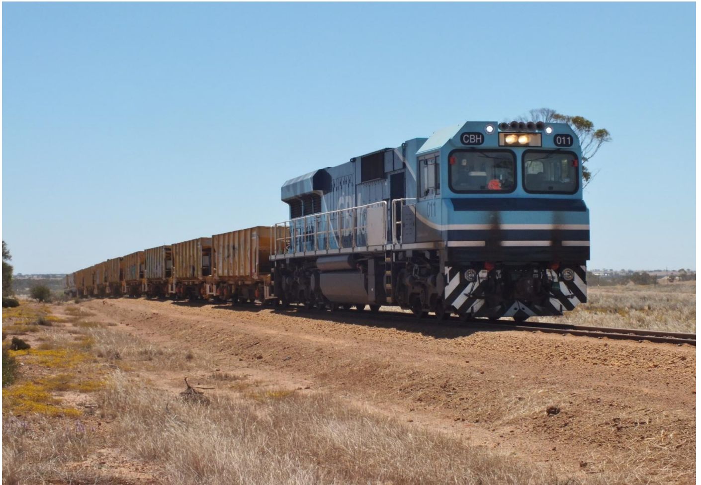
CBH011 on John Holland ballast train climbs grade north of Ballidu October 27th.