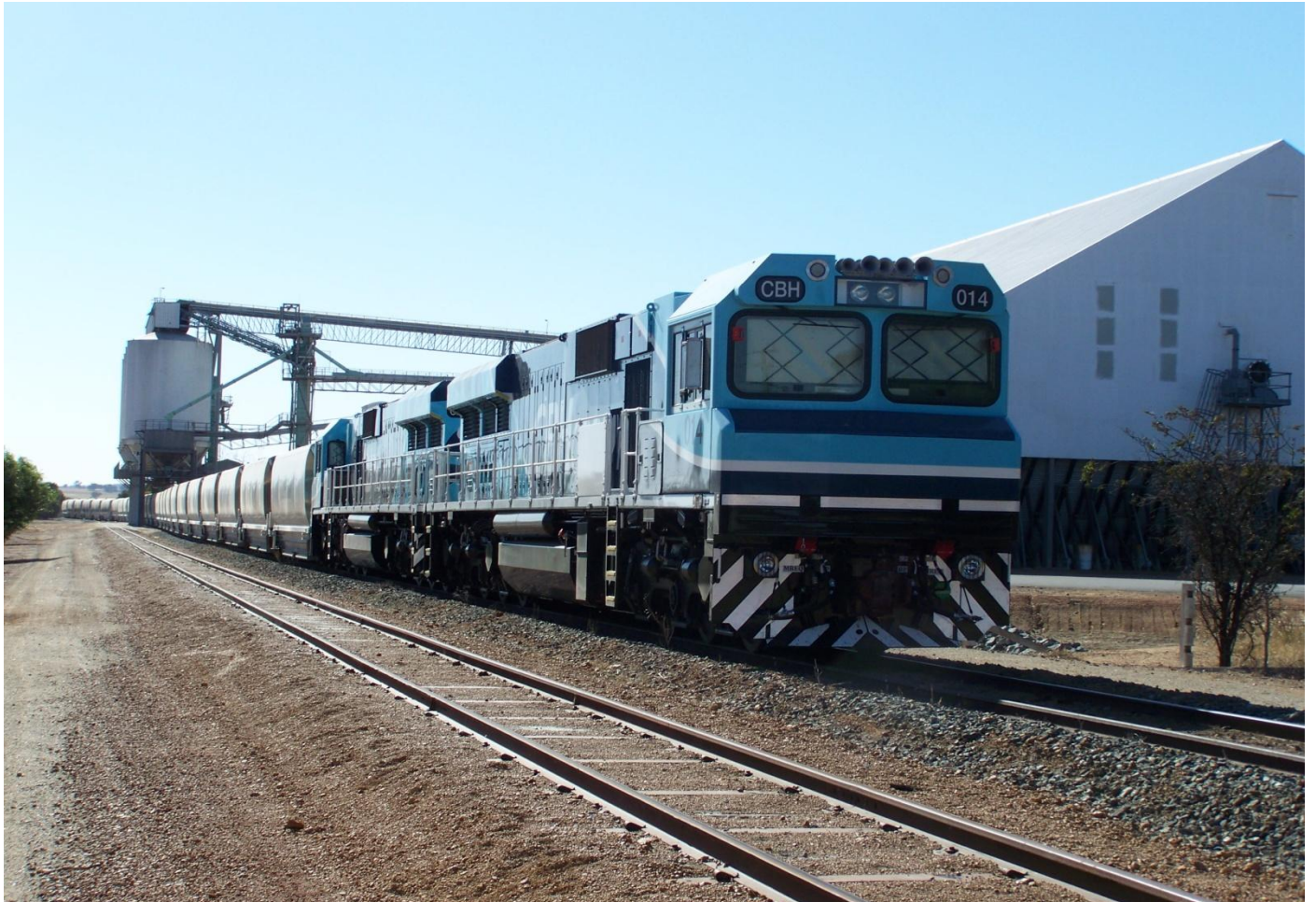
CBH014 & CBH015 on Watco grain train stabled at Brookton CBH October 21st.