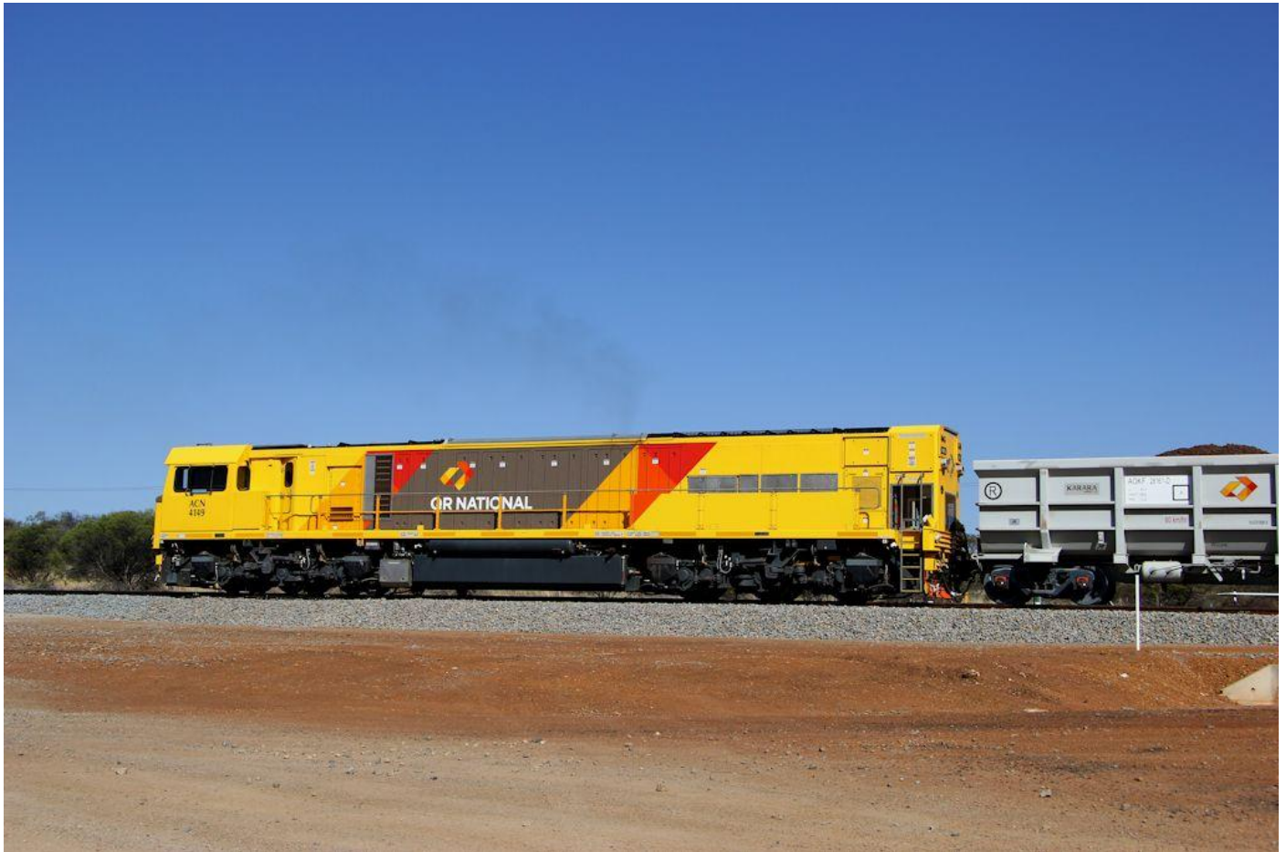
ACN4149 DPU on loaded ore train at Mullewa October 21st.