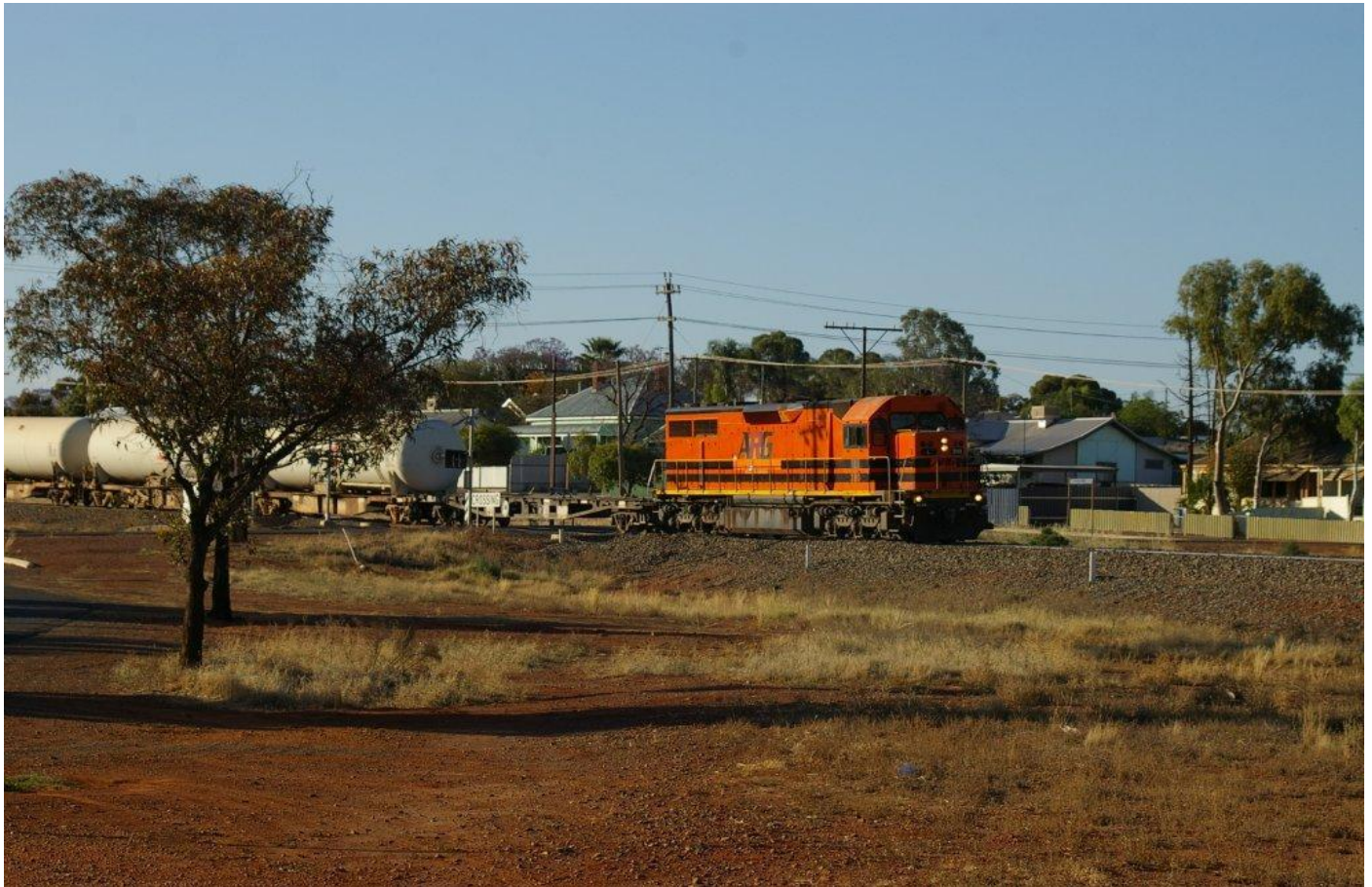
L3110 on empty ammonia tankers ex Leonora running on 1478 path crossing Piccidilly Street on the eastern side of Kalgoorlie as it approaches the junction with east west line October 21st.