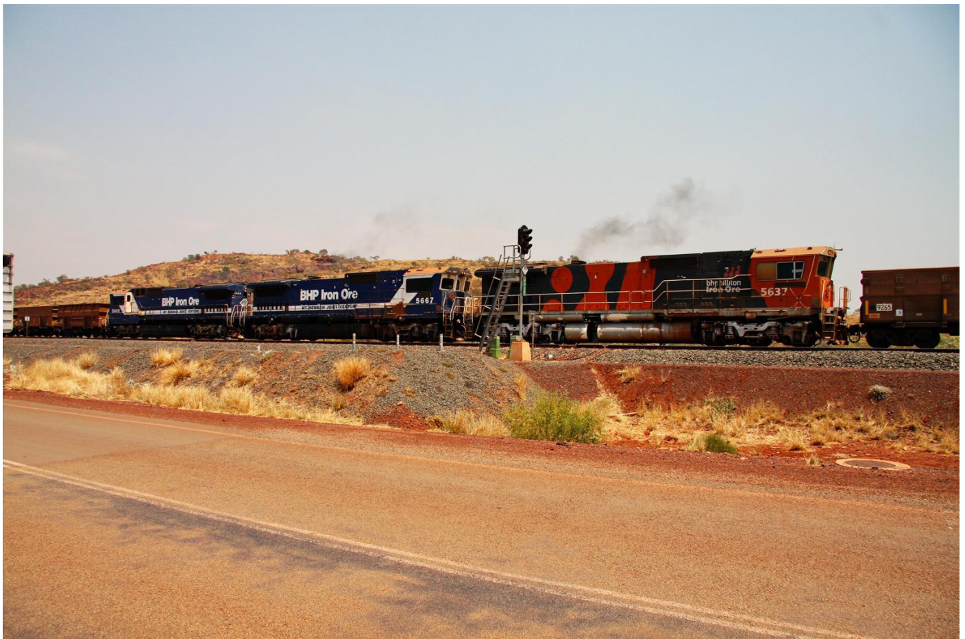
CM40-8M 5669, 5667 & 5637 on empty ore train through Kalgan Junction October 21st.