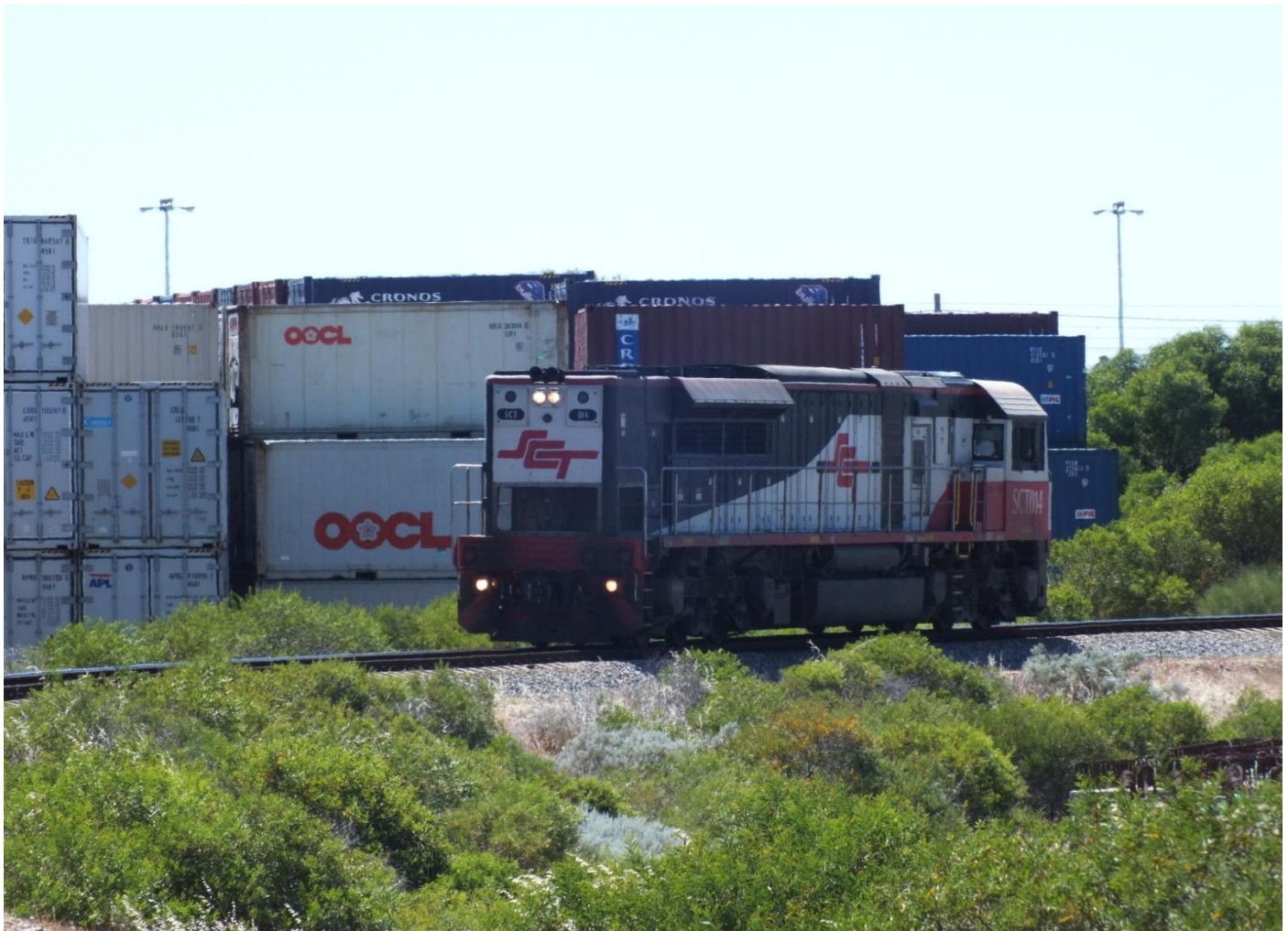
SCT014 on 5S66 light engine on PTA North Port line North Fremantle October 25th.

6003 & G516 only with a crew car and having no loading ran interstate as 3PM1 QRN intermodal out of Forrestfield on evening of October 23rd.