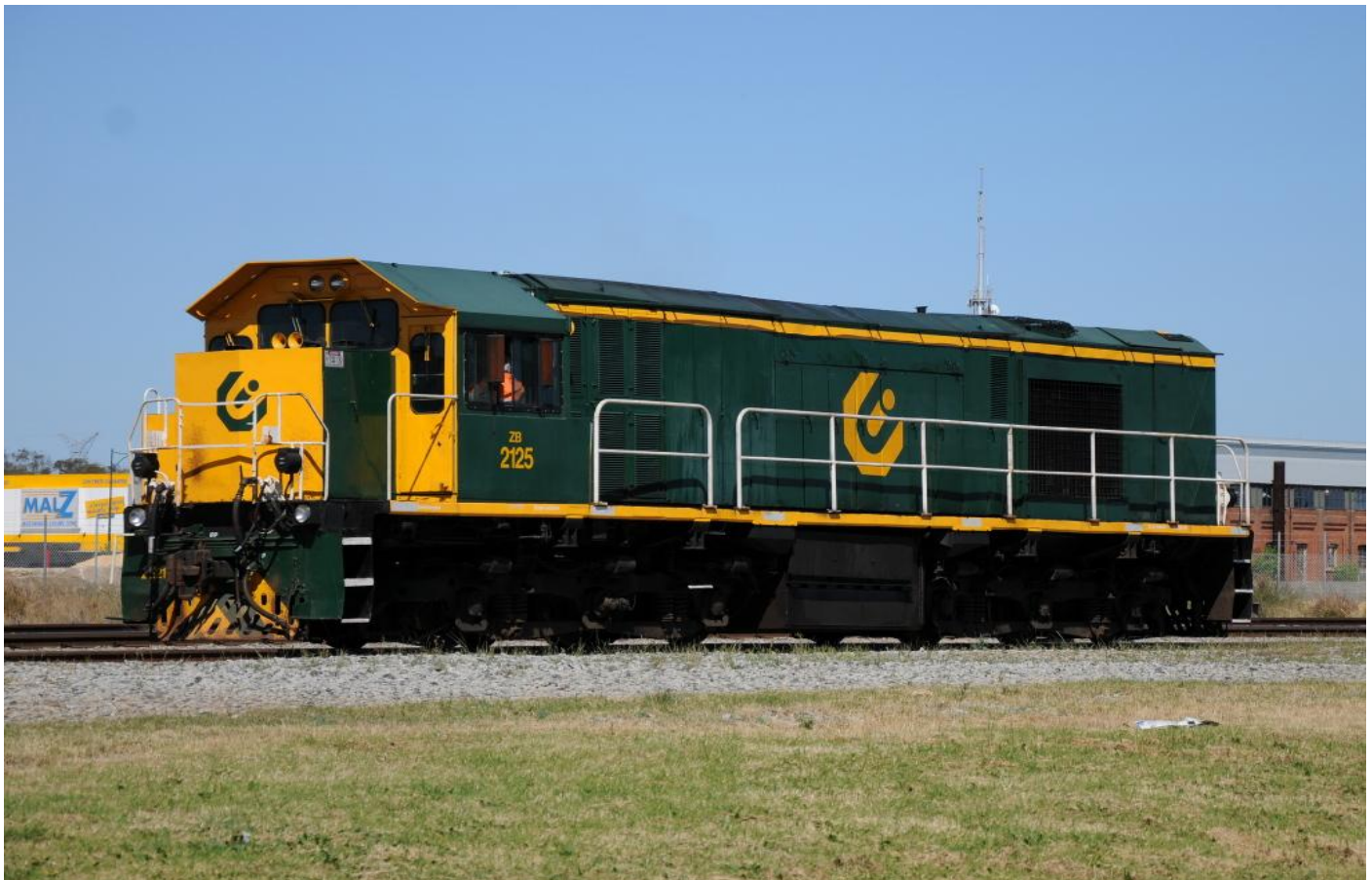
ZB2125 on 1K41 Watco light engine to Wongan Hills to run ballast trains on McLevie line upgrading for Qube Logistics departing Midland October 21st.