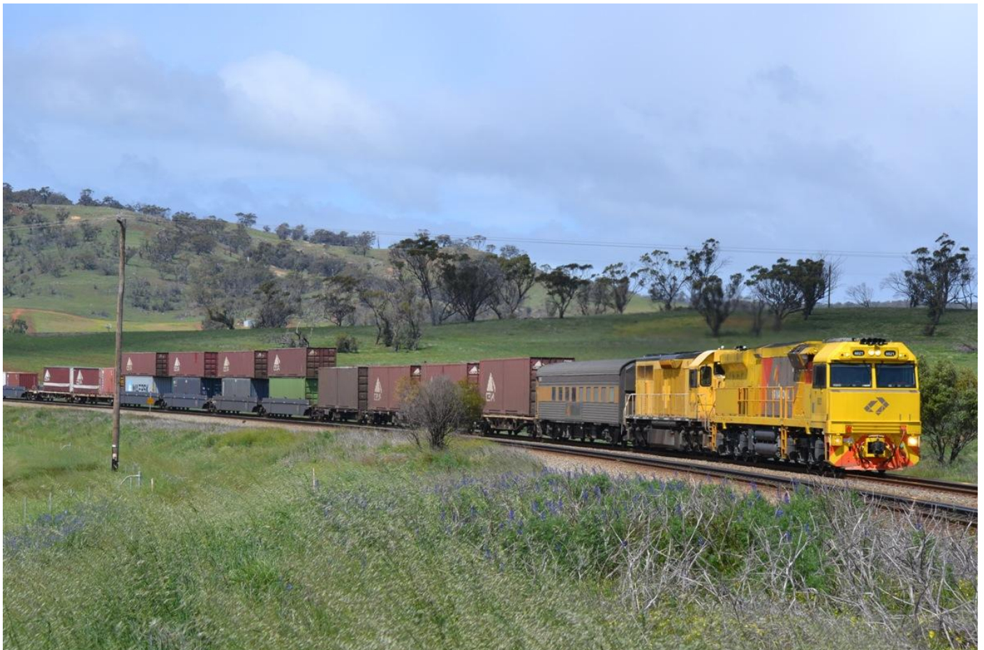
6021 & L3108 on 2MP1 QRN intermodal at Toodyay on September 27th.