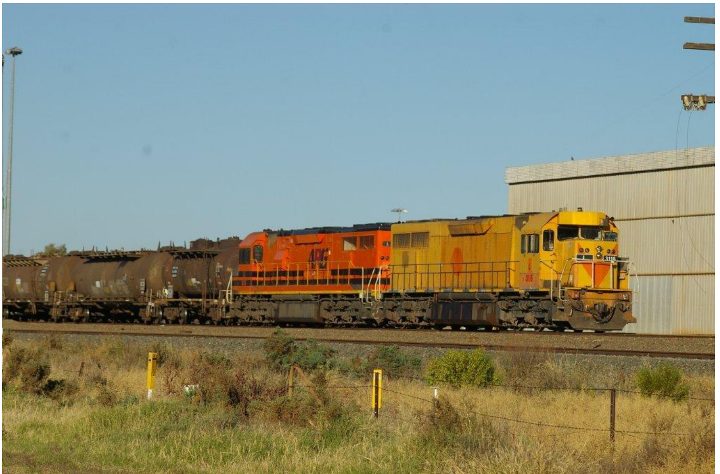
L3116 & L3110 on 6478 empty fuel tankers at West Kalgoorlie October 19th.