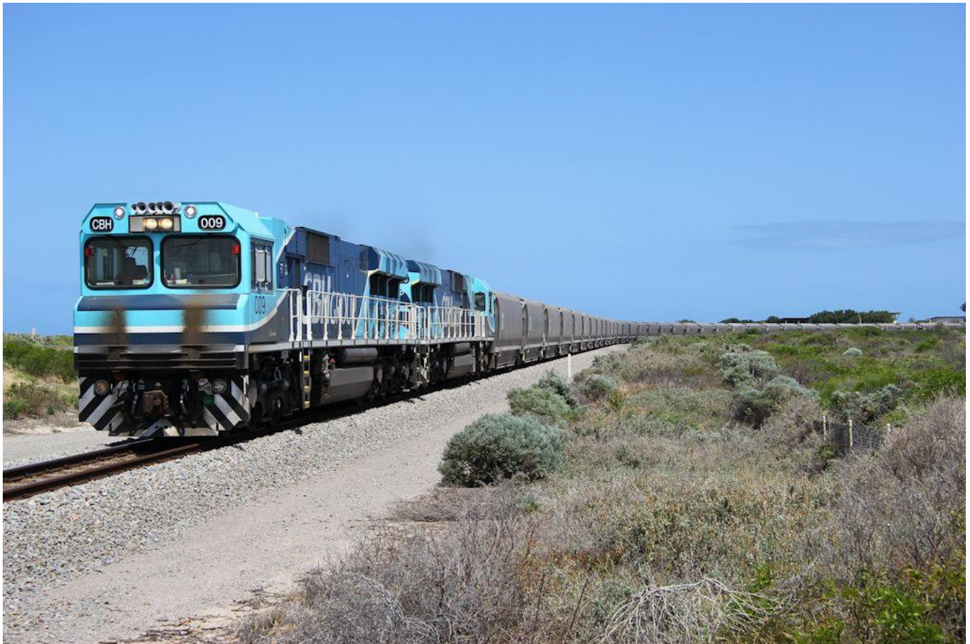
CBH009 & CBH003 on Watco grain at Willock Drive Geraldton October 13th.

DR8404 previously Hamersley Iron C636R 3011 was rebuilt at GTSA Engineering in Maddington for Greentrains in May/July 2008 for use in Pilbara but never saw any use is being scrapped at Gemco Bellevue. Proposed DR8406 was never completed and remained in Hamersley Iron livery as ex 3008 was scrapped at Maddington in late August/early September.