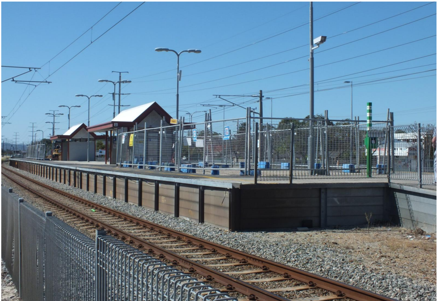
Queens Park Station being upgraded and improved October 21st.