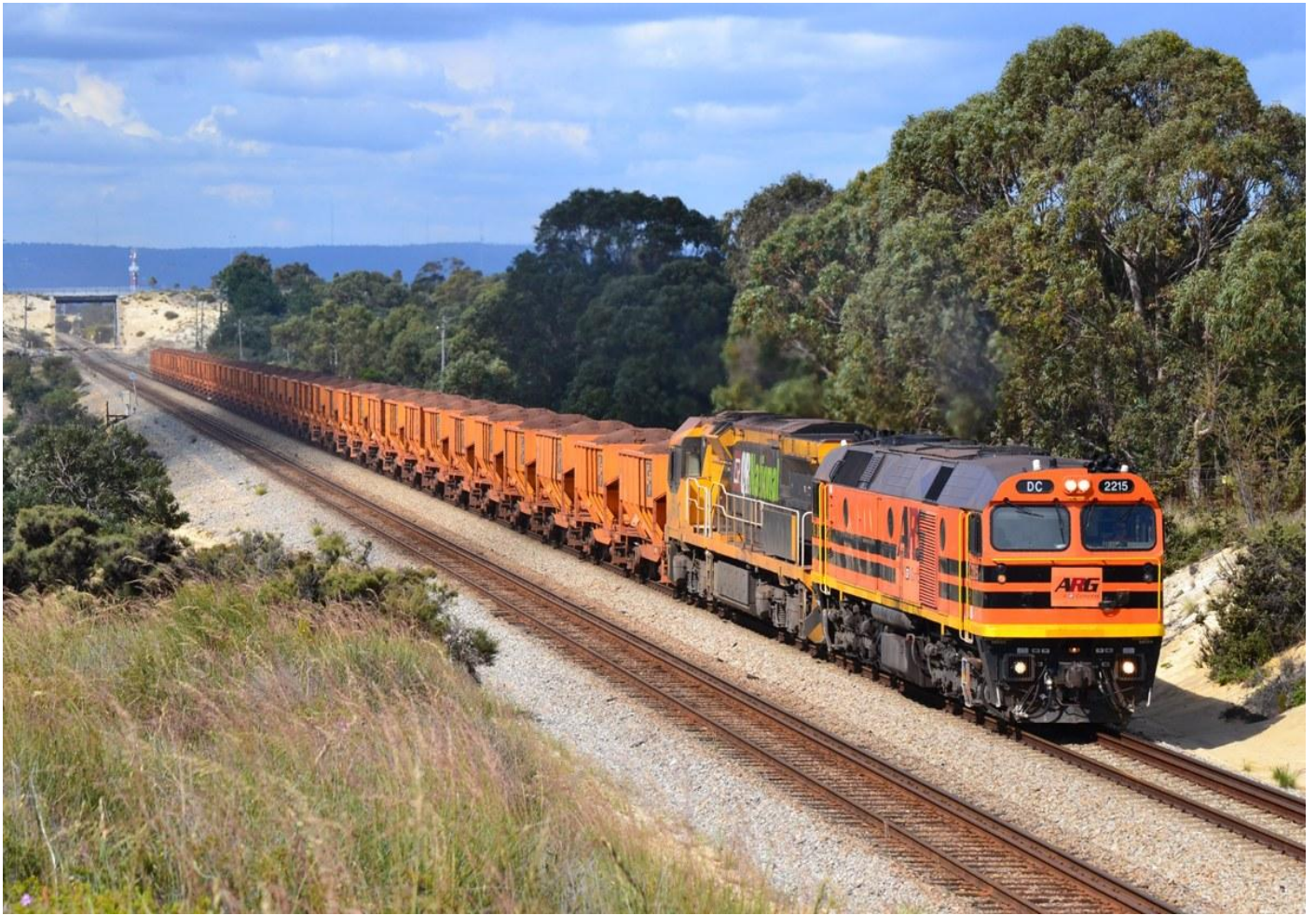
DC2215 & ACA6009 on 2034 ore train to Kwinana at Jandakot October 15th.