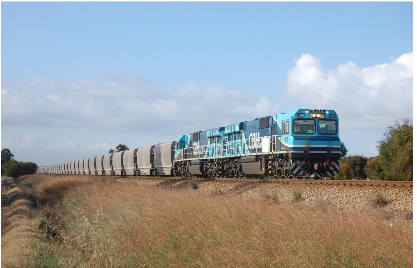
CBH011 & CBH004 on 4K63 empty Watco grain at Hazelmere October 3rd.