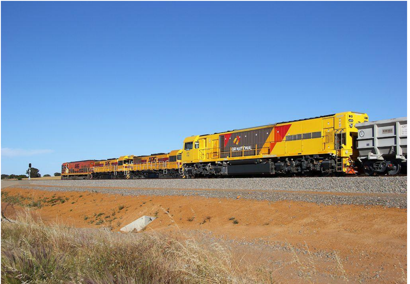
2512, DFZ2404 & DFZ2406 cross ACN4148 on Karara ore at Grants October 20th.