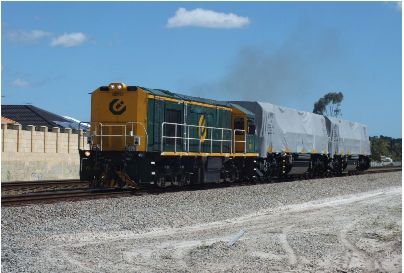
ZB2120 hauls WAMX3304 and WAMX3305 on 3K09 at Thornlie October 23rd.