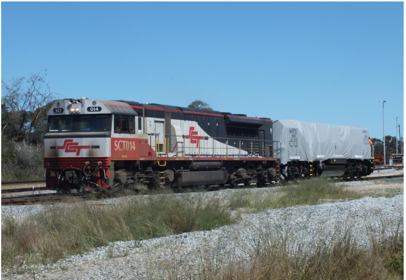
SCT014 & WAMX3306 [CBH118] on 5S67 light engines at Forrestfield October 25th.