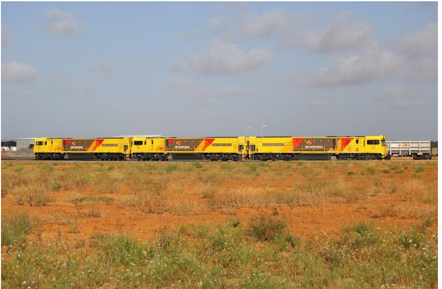
ACN4169, ACN4148 & ACN4171 at Narngulu East October 12th.