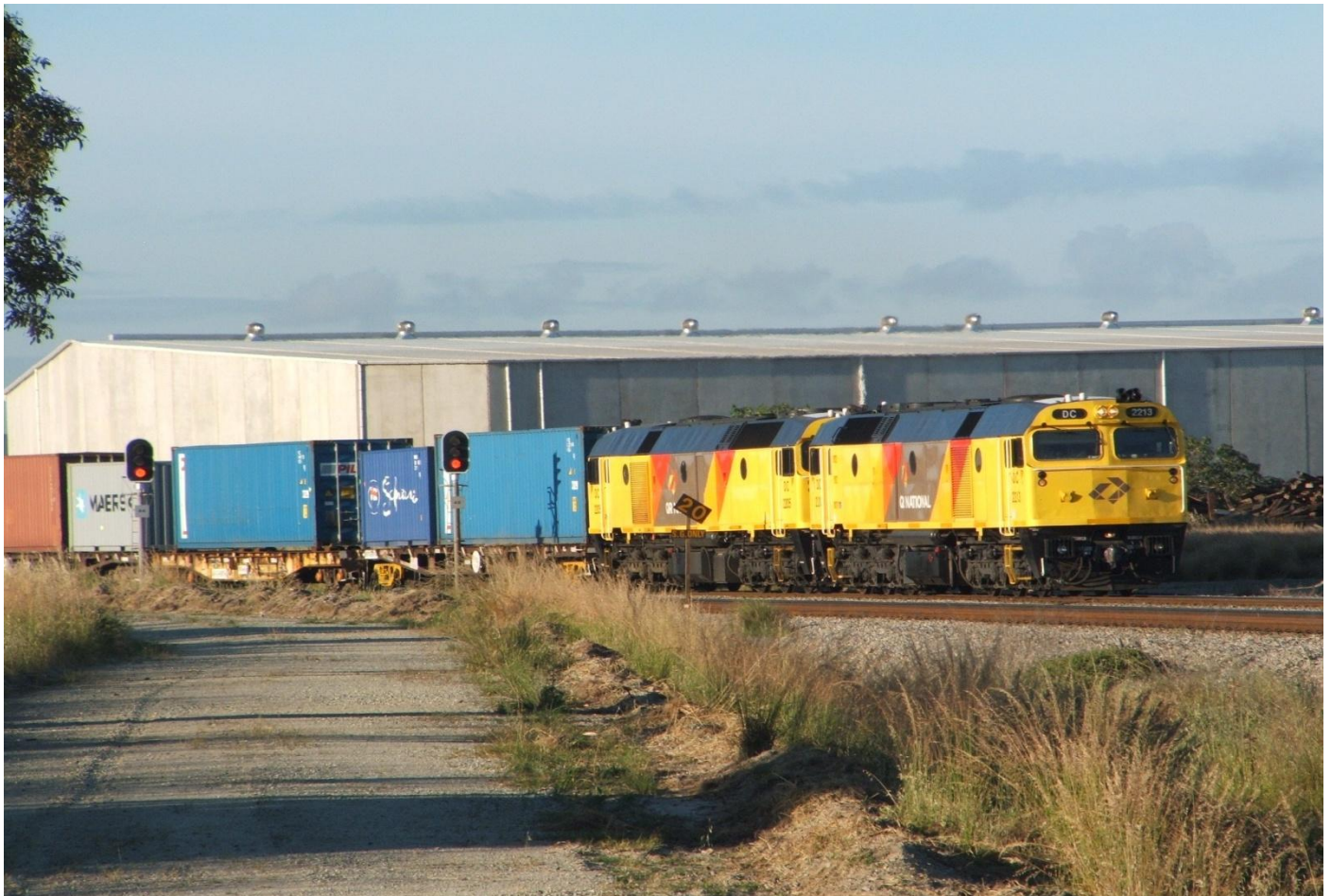
DC2213 & DC2205 run 6141 container train through Kewdale October 19th.