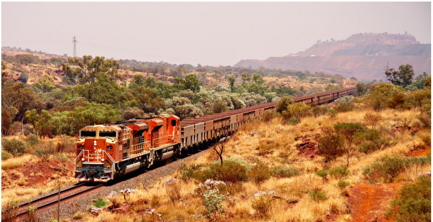
SD70ACe 4339 & 4332 on loaded ore train departing Mt Whaleback world's largest open cut iron ore mine for Newman and export through Port Hedland October 23rd.