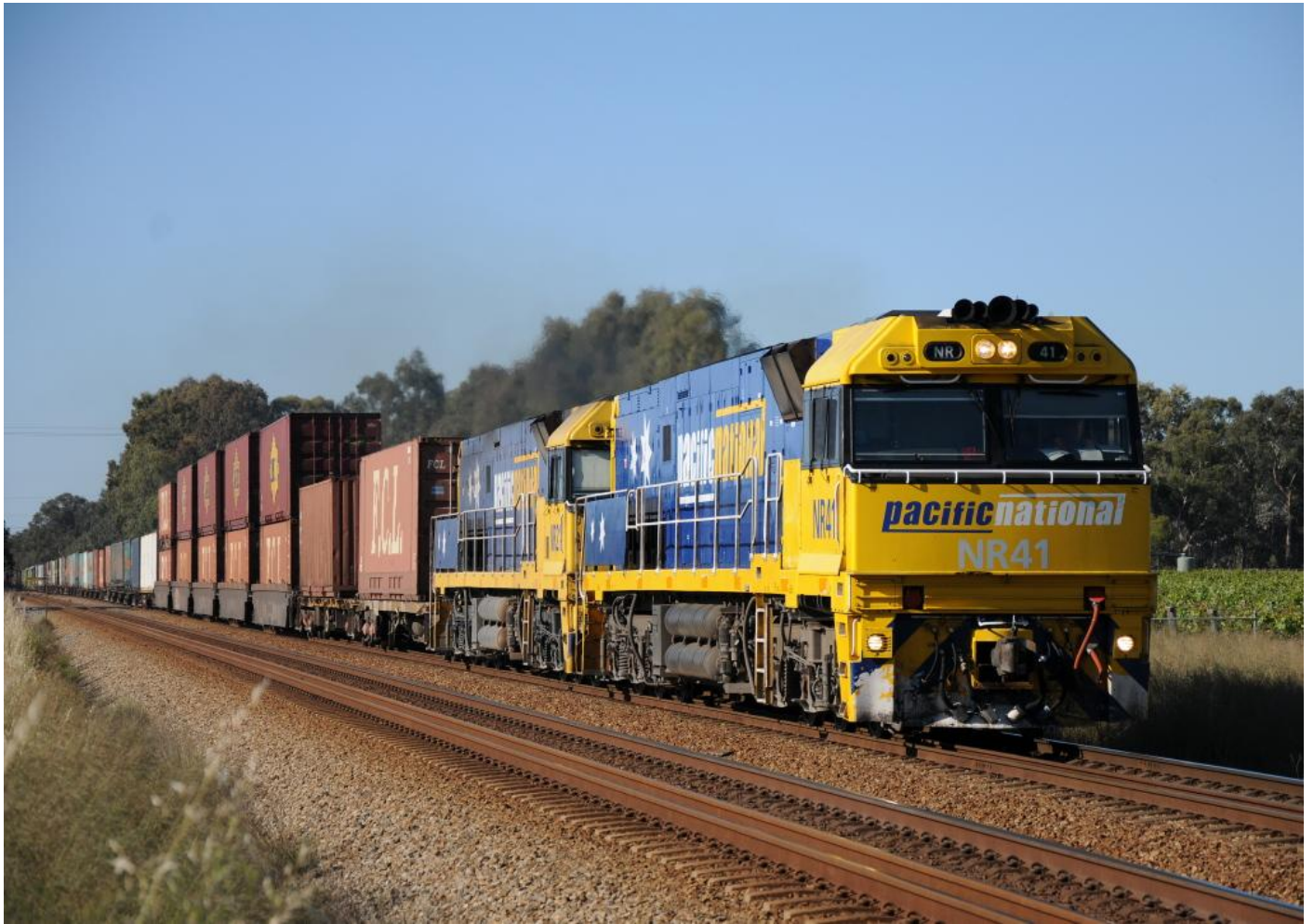
NR41 & NR21 on 1PS6 intermodal at Herne Hill October 21st.