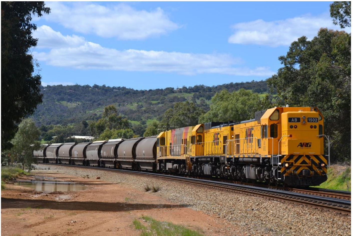
AB1503, AB1502 & P2504 on 4342 QRN grain at Brigadoon September 12th.