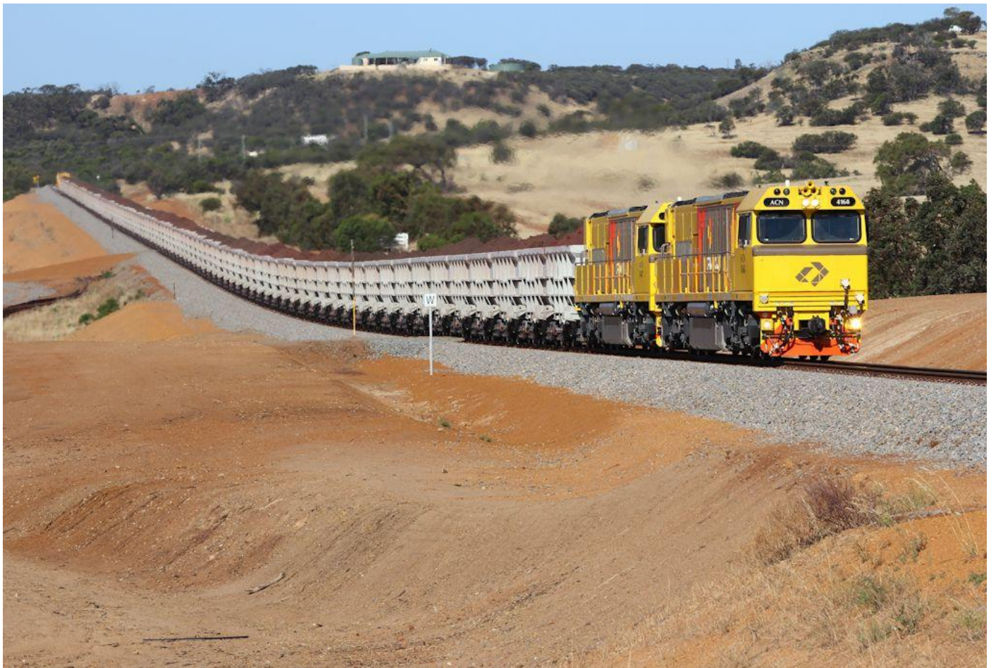
ACN4168 & ACN4147 DPU ACN4146 on 1763 Karara ore train west of Bringo 11/11.