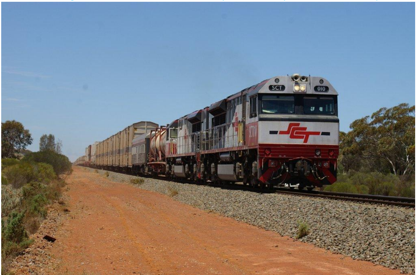
SCT010 & SCT001 run 6MP9 SCT freight east of Golden Ridge November 11th.