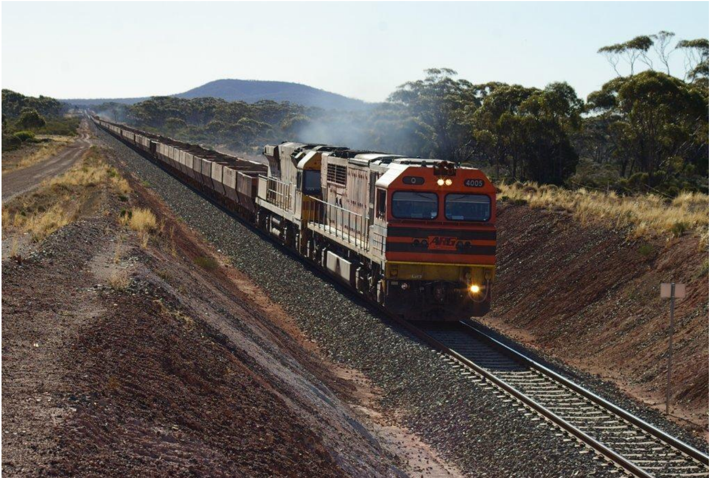
Q4005 & AC4304, DPU ACB4402 & ACB4404 on 1413 ore train Bonnie Vale 11/11.