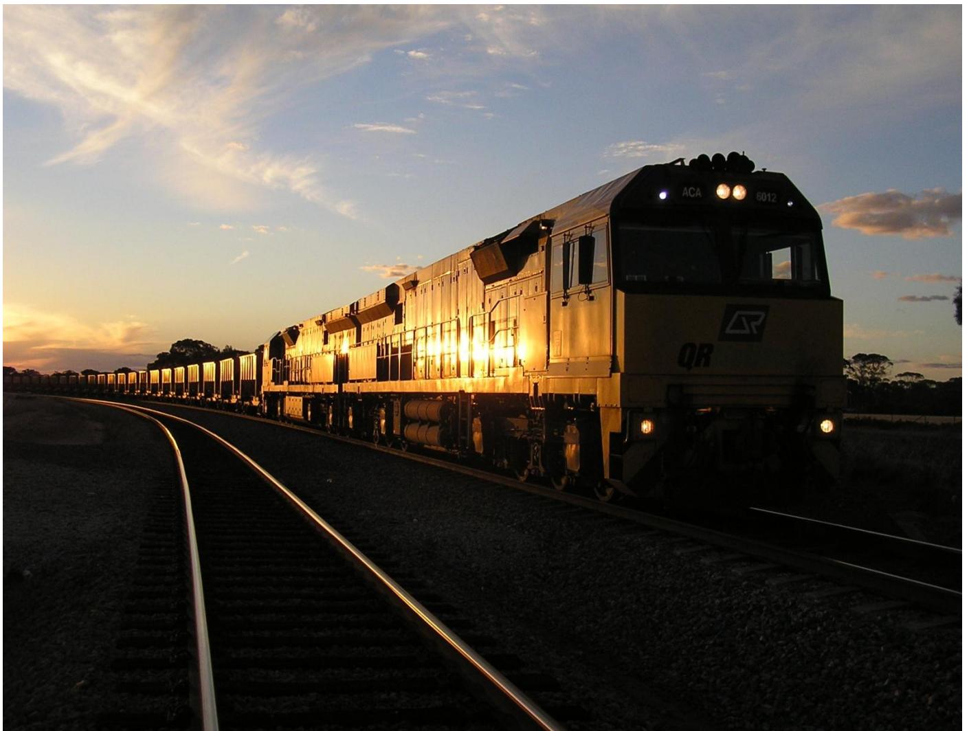
ACA6012 & ACA6011 on 4035 empty ore train just arrived at West Merredin 7/11.