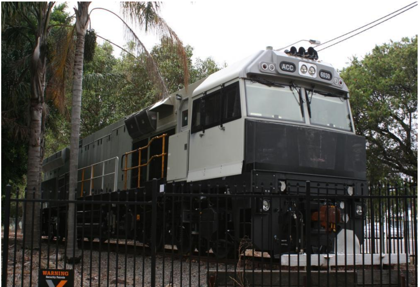
ACC6030 still in undercoat in UGR Broadmeadow NSW plants yard on November 15th.