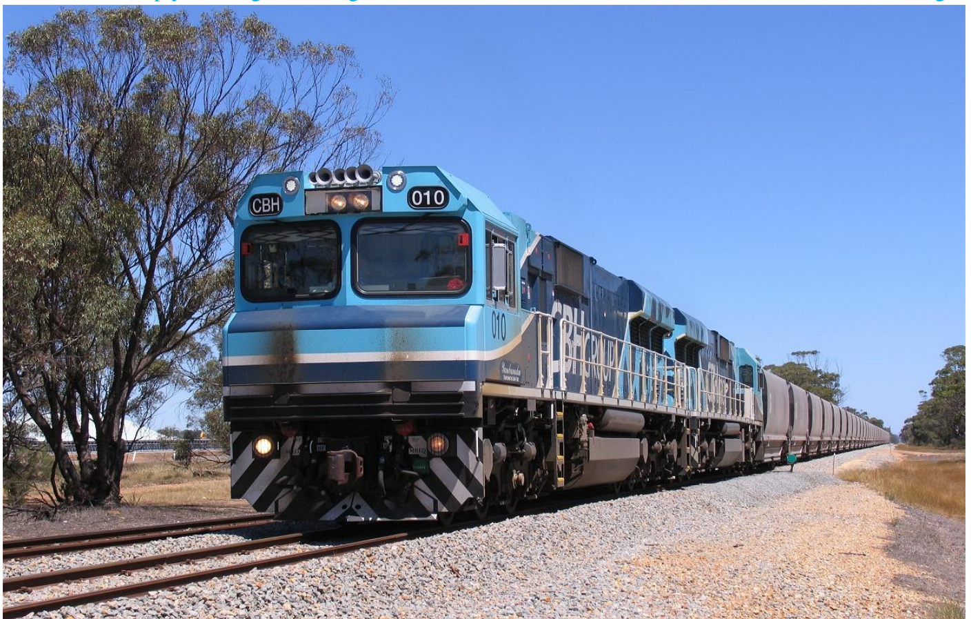
CBH010 & CBH004 at Moora after splitting train in half to enter CBH silo 11/11.