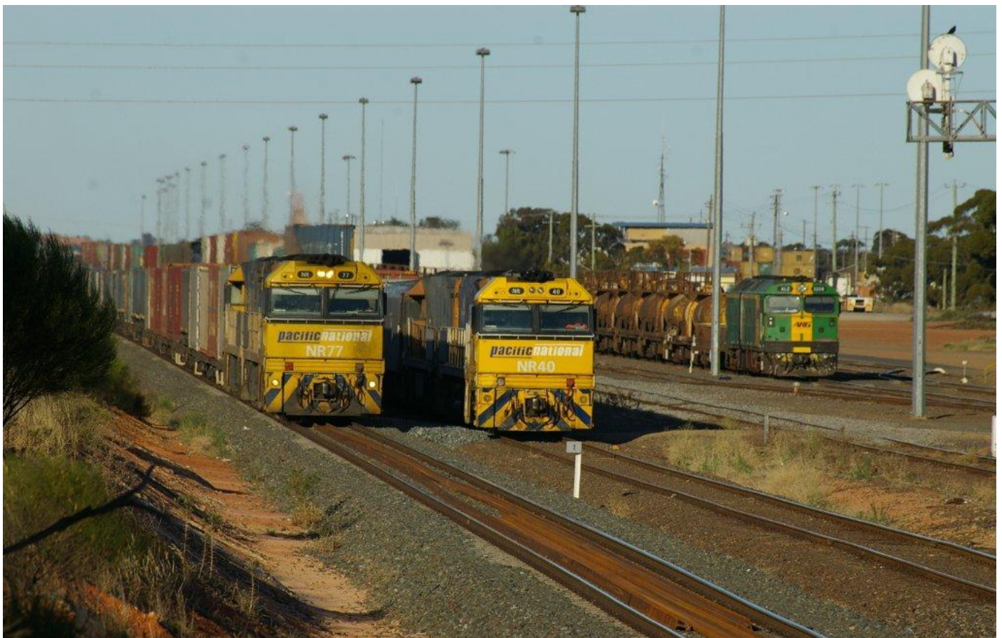
NR77 & NR120 on 3SP7 on the main line with NR40 & NR104 on 3MP5 on the loop with ALZ3208 to be second unit on 5426 in the yard at West Kalgoorlie on November 15th.