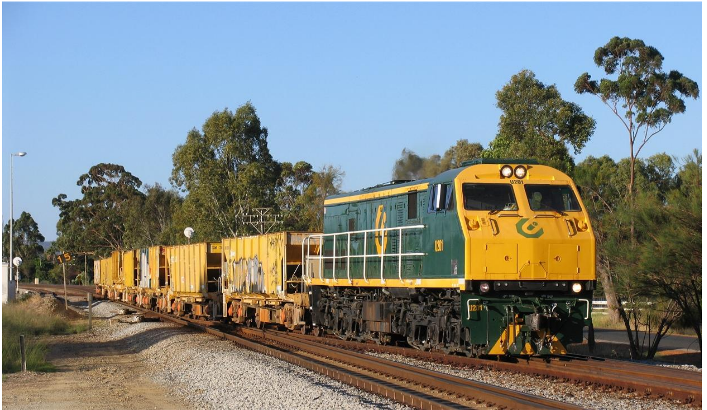
U201 on 1QB2 empty ballast crossing over at Millendon Junction November 11th.