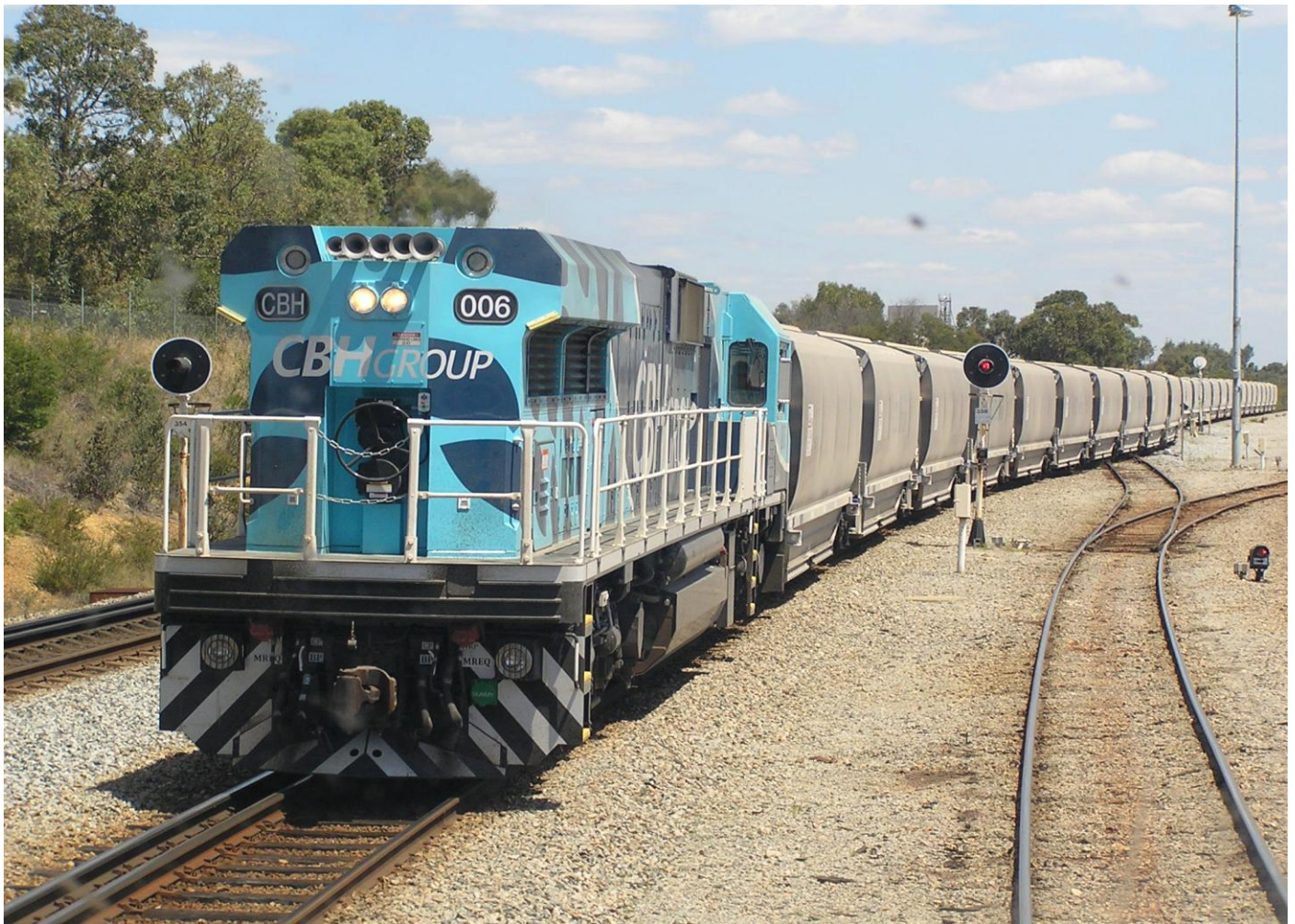
CBH006 runs empty Watco grain through Forrestfield November 8th.