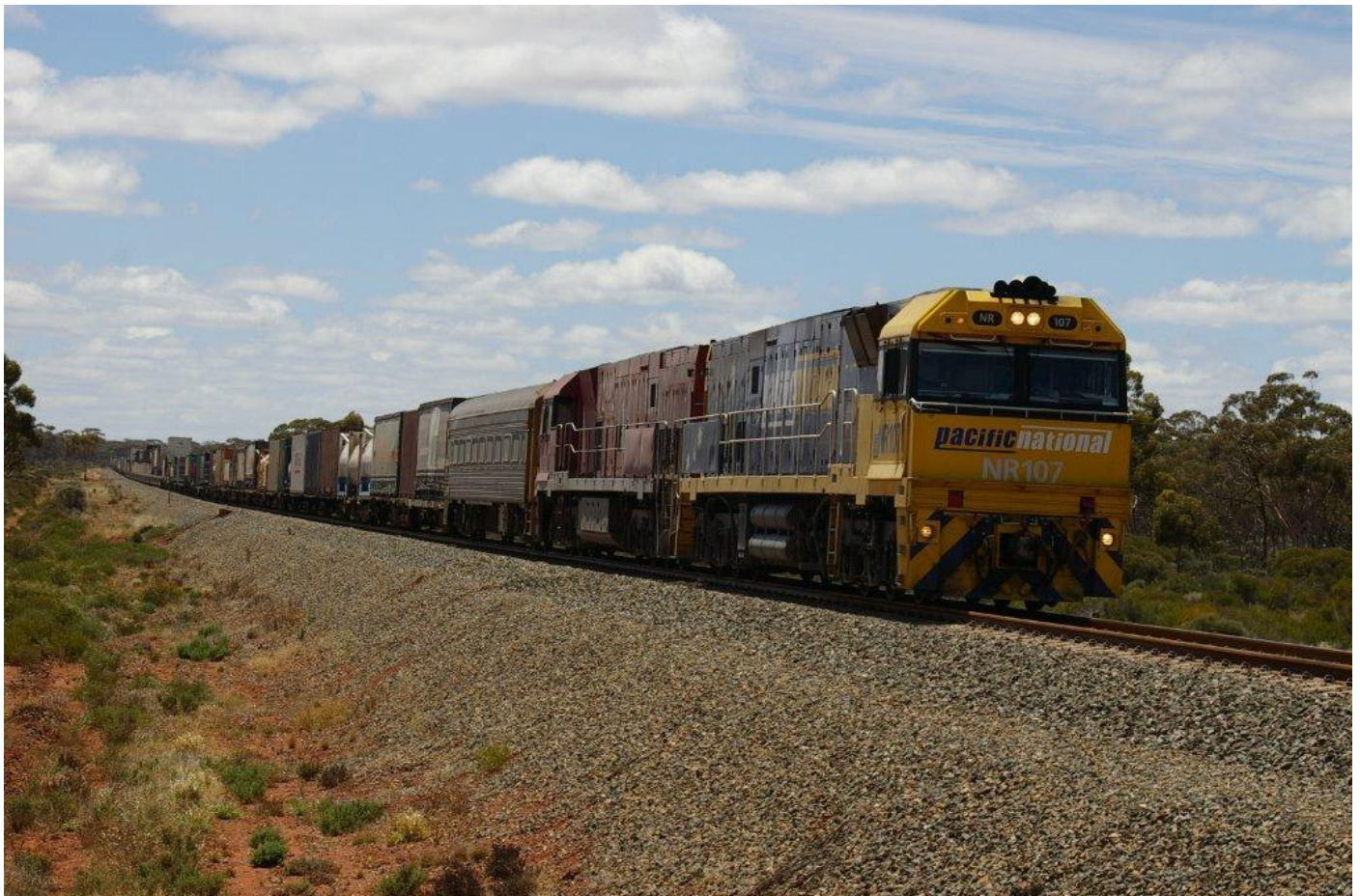
NR107 & NR75 on 6MP4 intermodal at Mungari [west of Kalgoorlie] on 11/11.