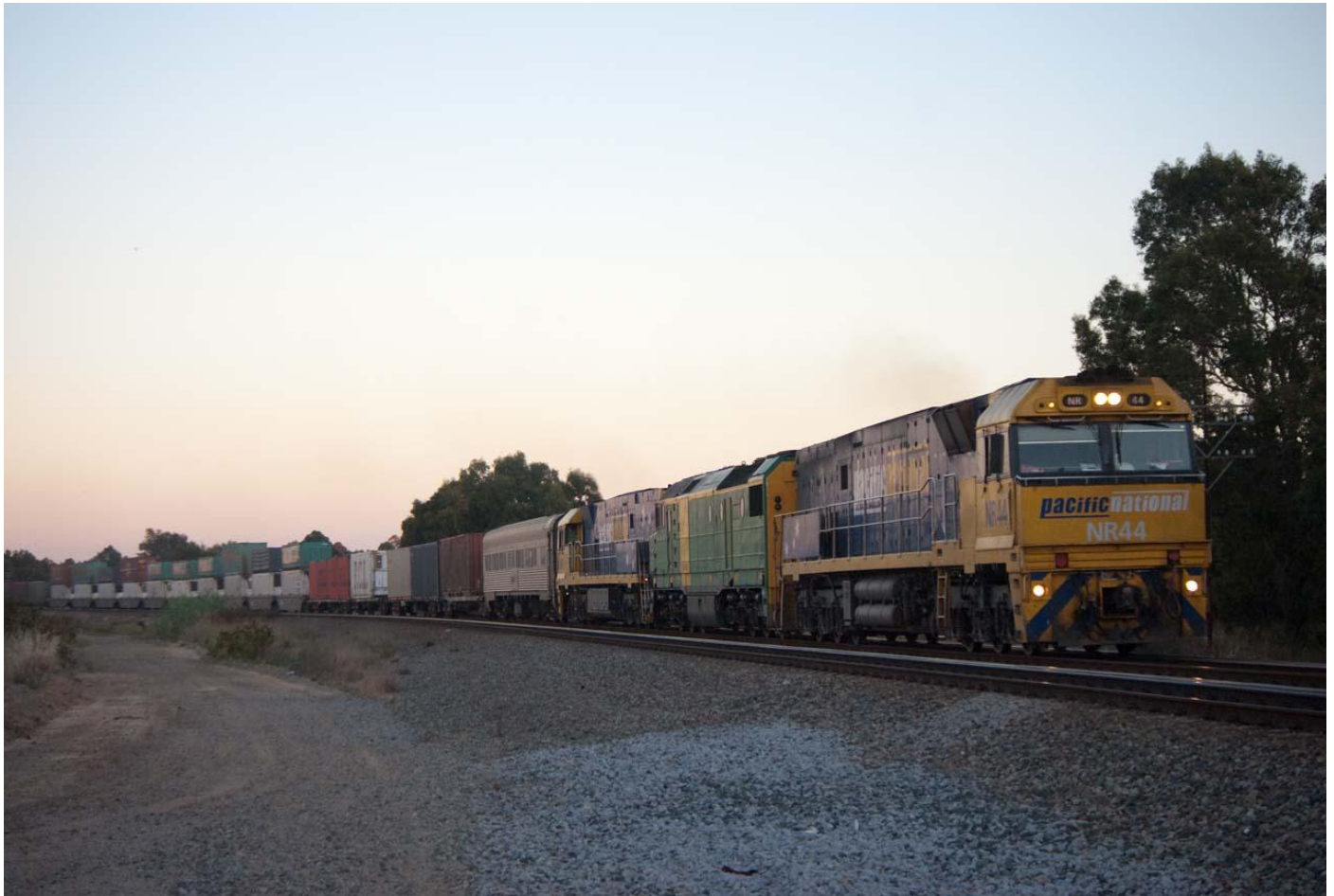
NR44, DL48 & NR49 run late P/N intermodal 2MP5 at Swan View on November 15th.