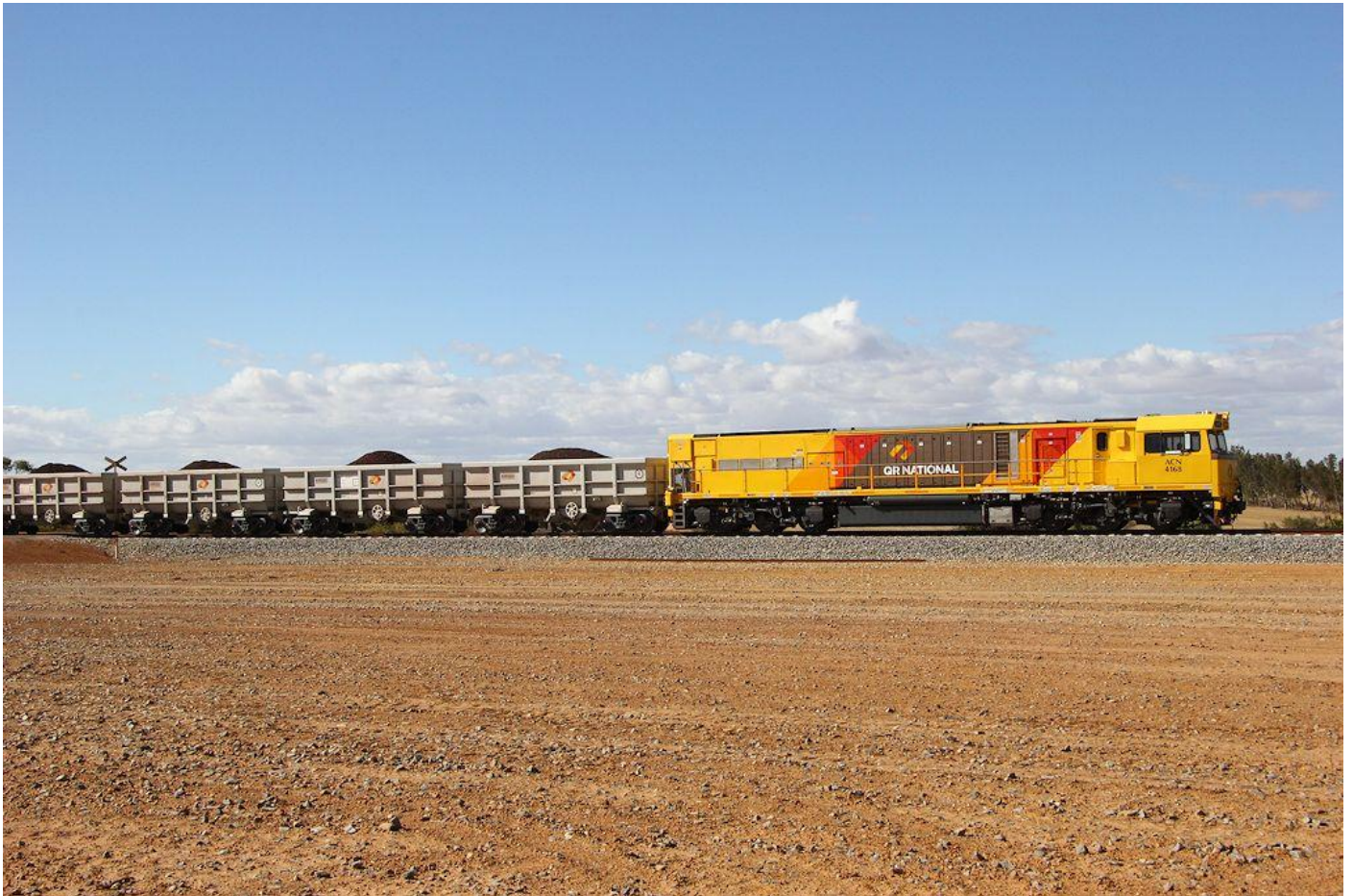
ACN4161 DPU on loaded Karara ore train at Indarra November 3rd.