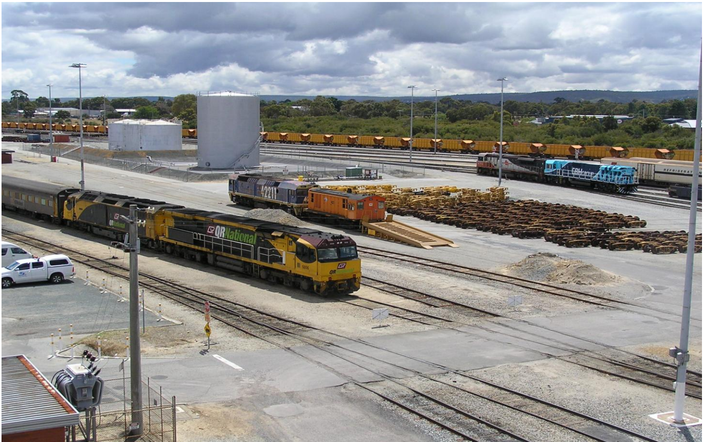
6006 & CLP11 intermodal locomotives with crew car, stowed 527 and 42211 with SCT014 hauling just released CBH018 into Forrestfield yard on November 6th.