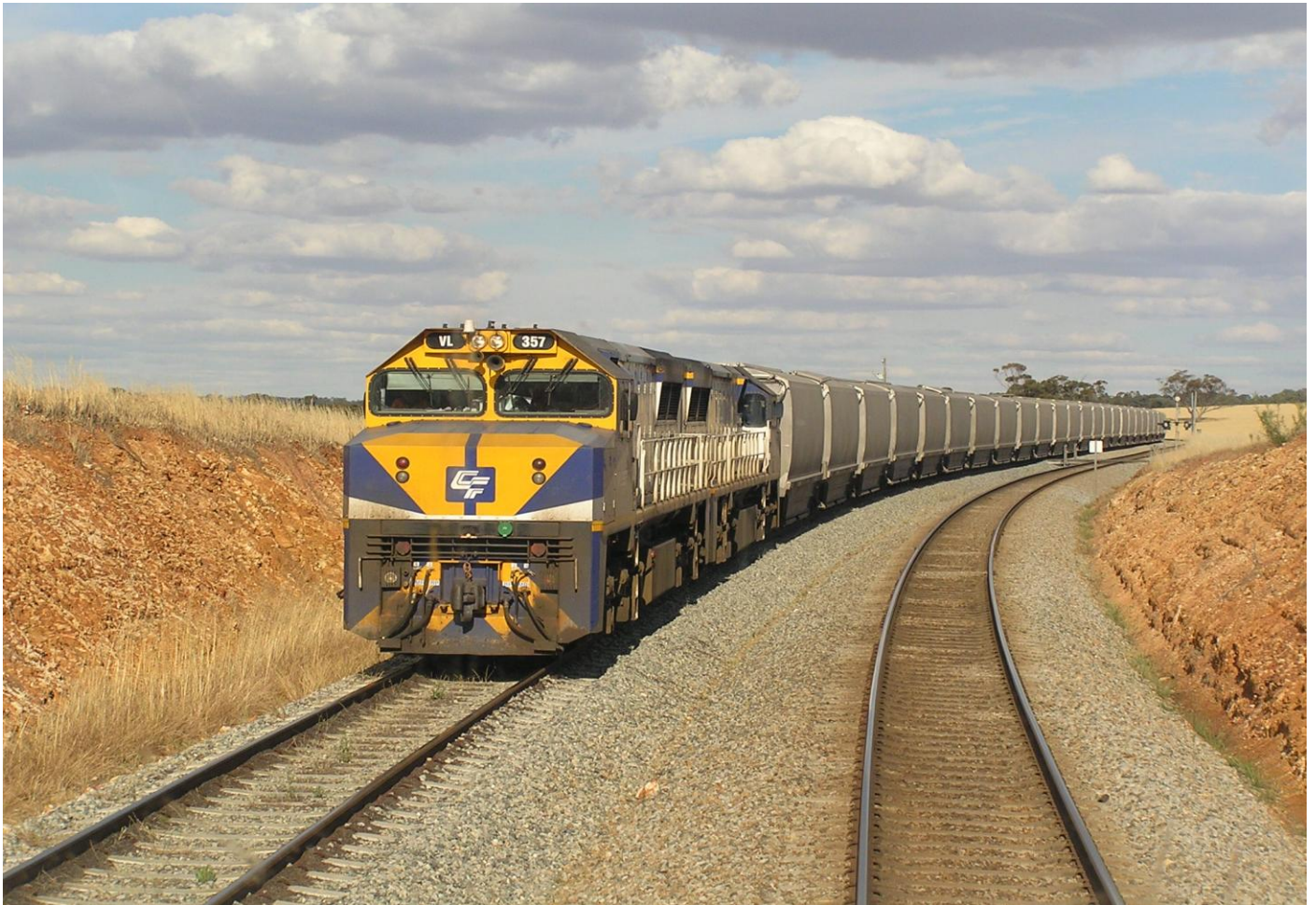
VL357 & VL361 on 4S58 Watco grain at Grass Valley November 7th.