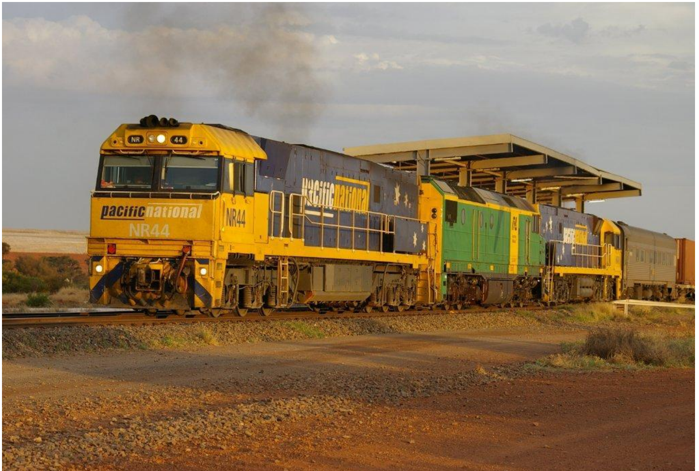
NR44, DL48 & NR49 on 3MP5 intermodal entering Parkeston November 14th.