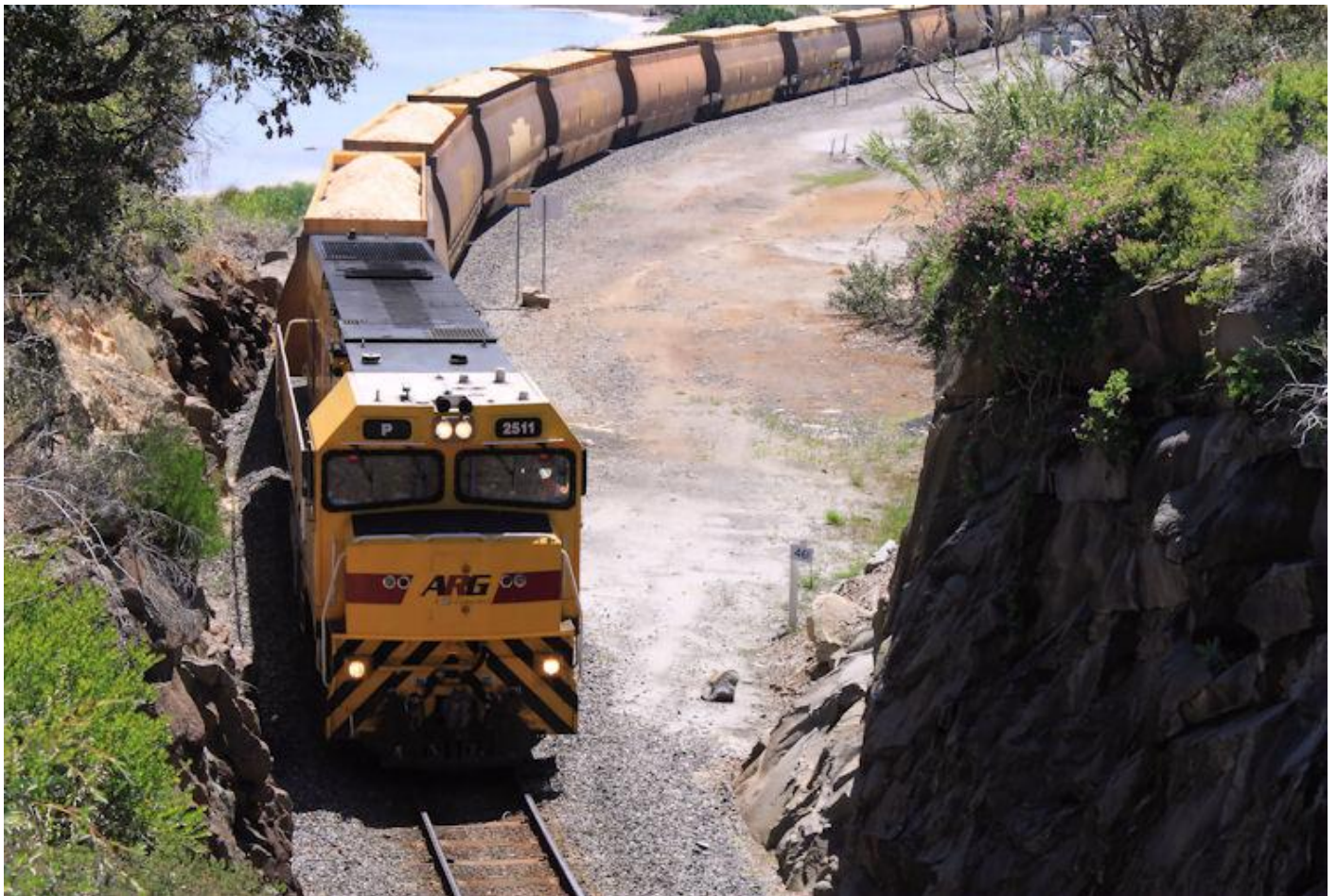
P2511 on woodchip train about to cross under Princess Royal Drive Albany 12/11.