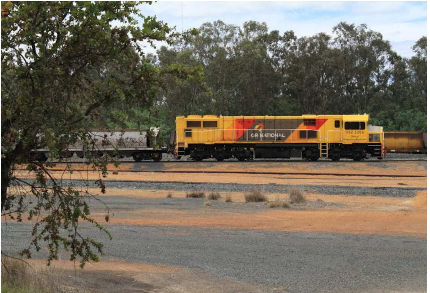
DBZ2309 on empty coal train in Collie Yard October 24th.