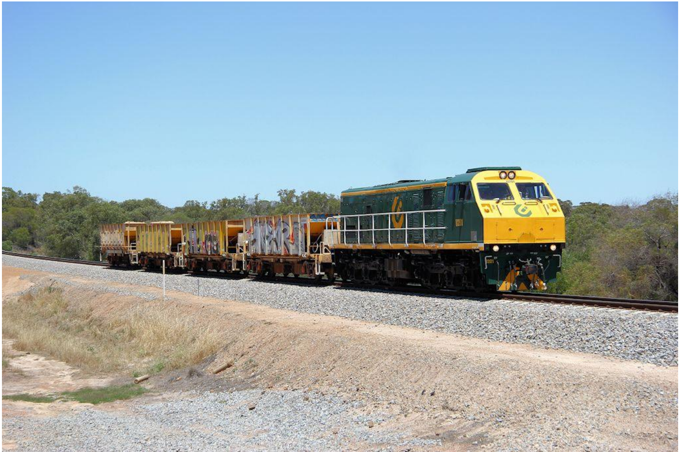
U201 at Bringo on the first train its hauled in WA of four empty ballast wagons being run from Narngulu to Northern Gully to collect another four ballast wagons stabled there November 11th.