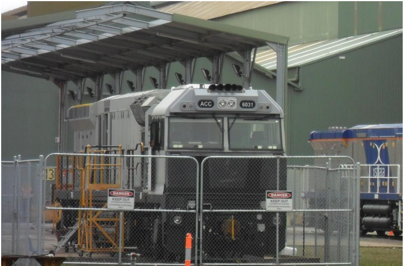
ACC6031 also in undercoat under test at UGR Broadmeadow November 15th.