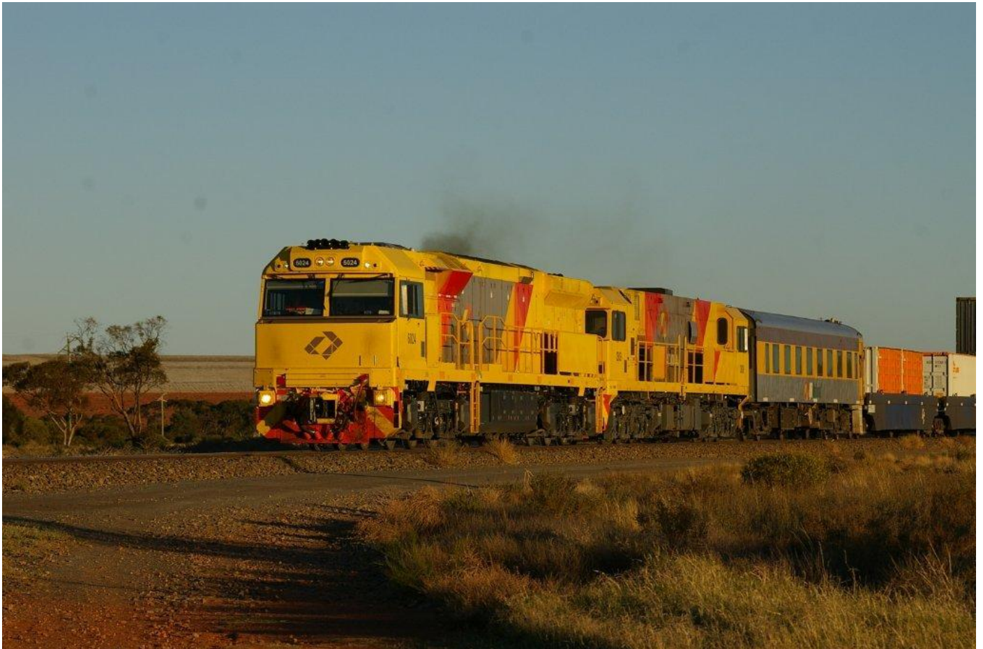
6024 on its first run to WA with 2809 on 6MP1 intermodal arriving Parkeston 11/11.