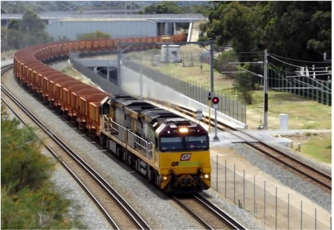
ACA6012 & ACA6011 on 2030 ore train at Thornlie November 12th.