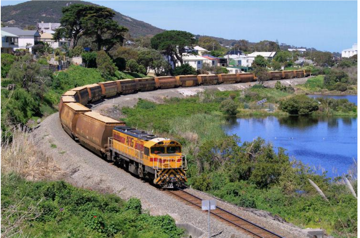
DD2356 on rear with P2511 on head end of woodchip train entering Albany 12/11.

DL48 first Pacific National DL locomotive to run to Perth freight Terminal Kewdale for over three years arrived on 2MP5 behind NR49 and ahead of NR44 on November 15th returning interstate on 5PM5 that evening behind NR44 dead attached ahead of NR49.