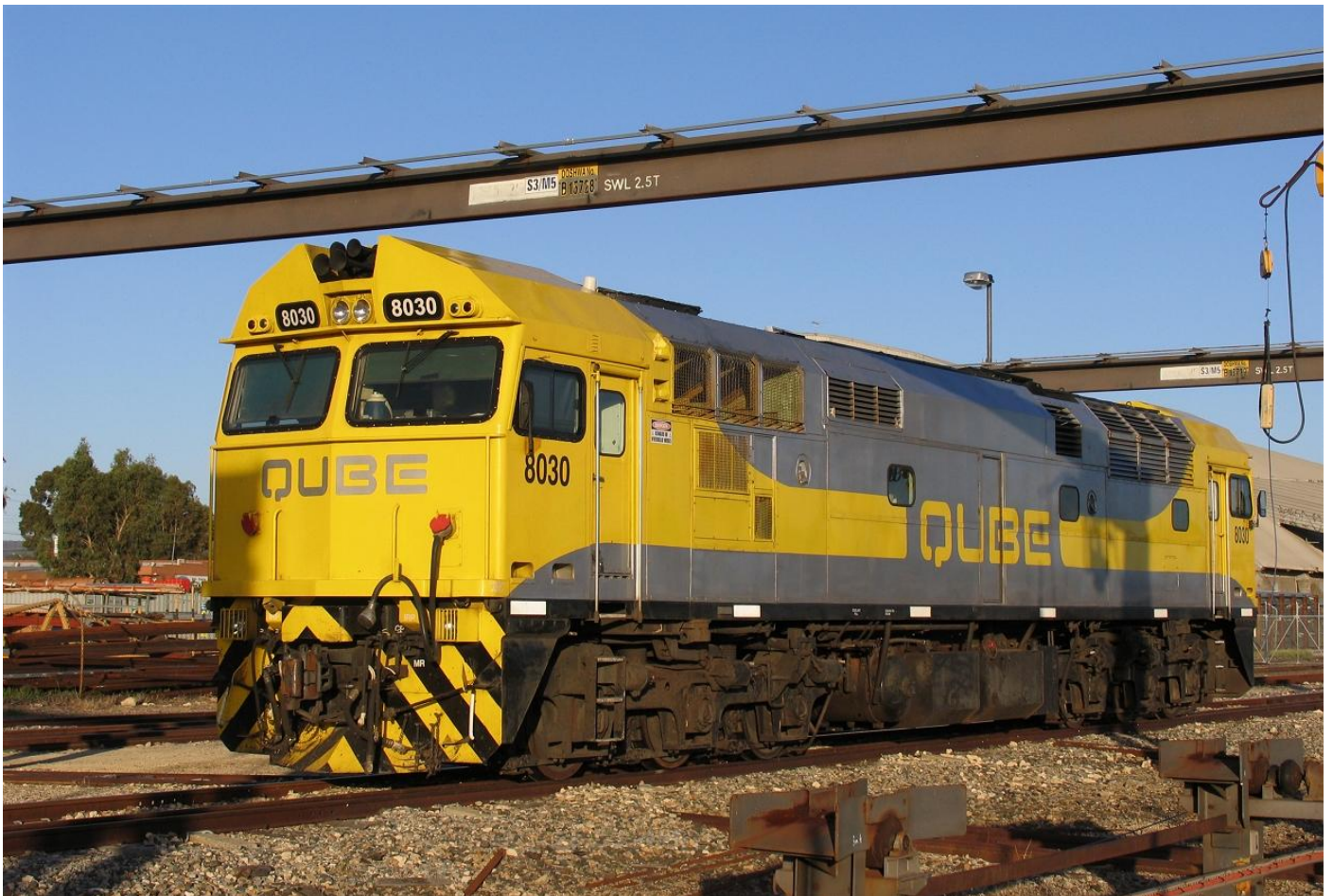
8030 stabled at Flashbutt yard November 11th.