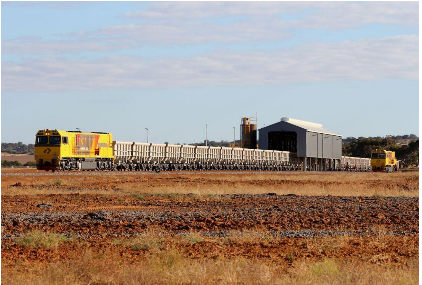
ACN4151 and ACN4171 at new QRN Narngulu East service facility November 3rd.