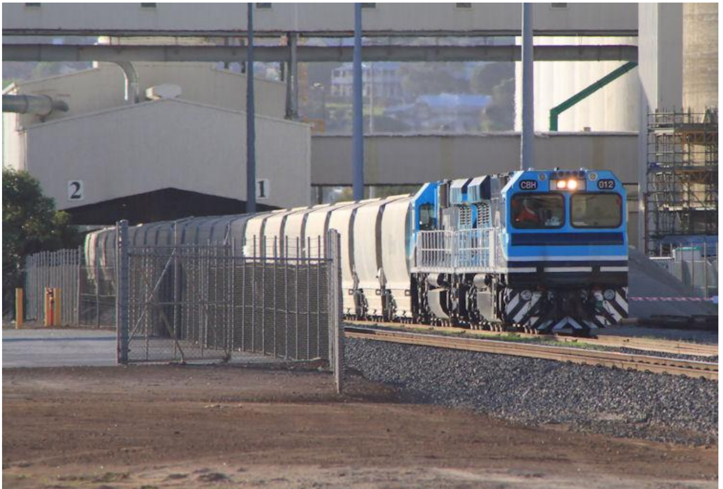
CBH012 & CBH013 on Watco grain unloading at CBH Albany on November 8th.