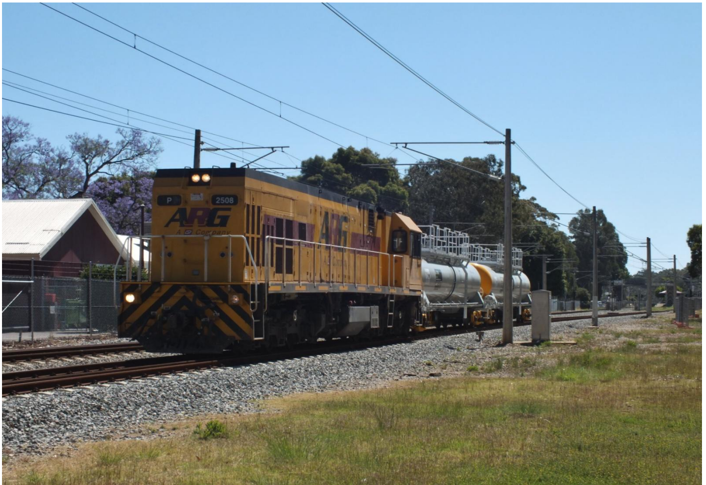
P2508 on 4110 Bassendean shunter with two new JP tankers ex UGR at Guildford 14/11.