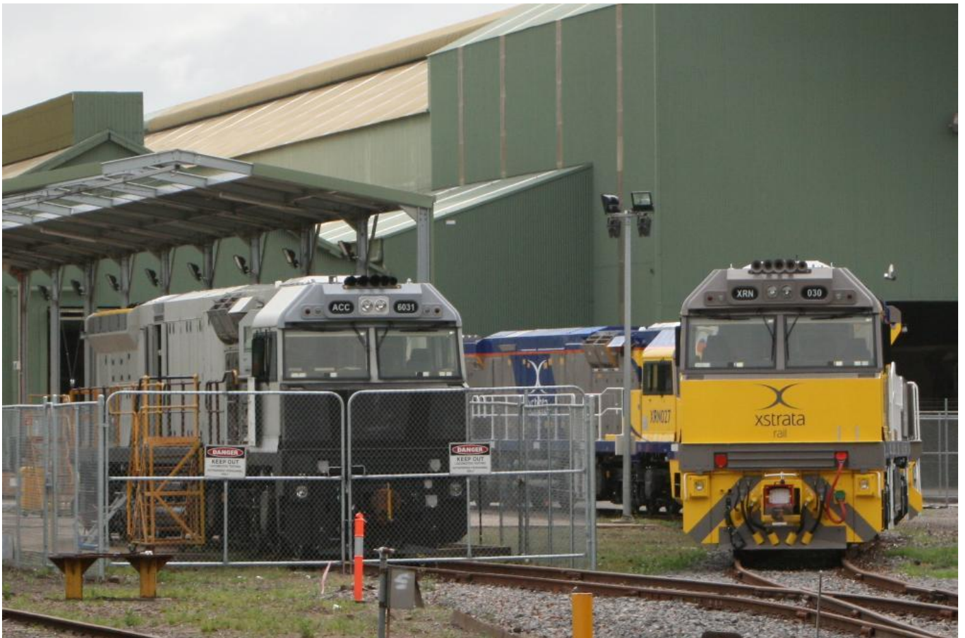
ACC6031 beside XRN030, XRN029 & XRN027 in UGR Broadmeadow yard 15/11.