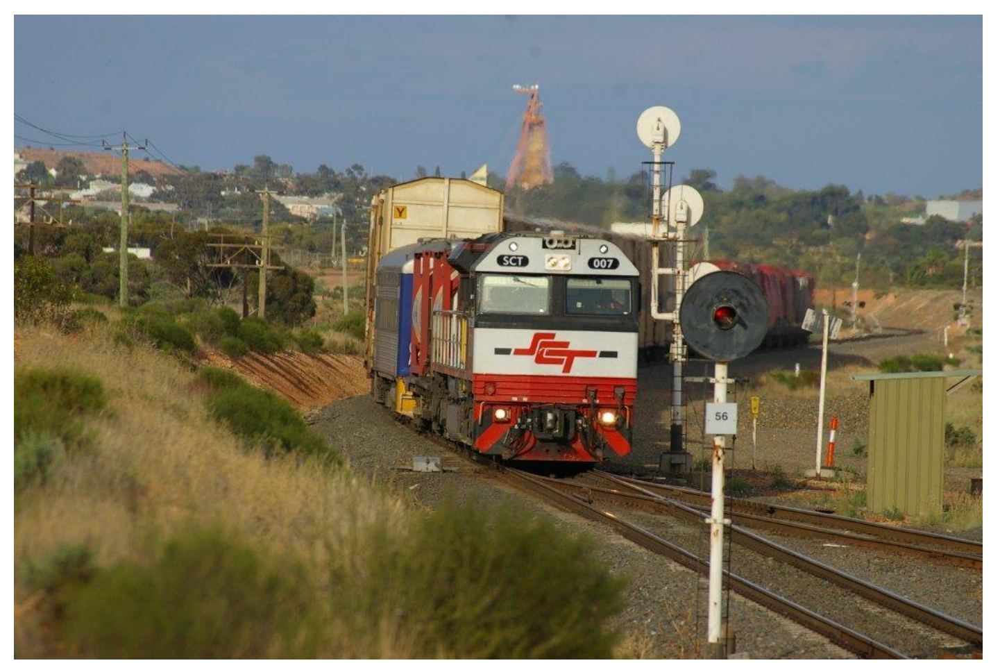
SCT007 runs 2AP9 SCT special service arriving West Kalgoorlie November 27th.