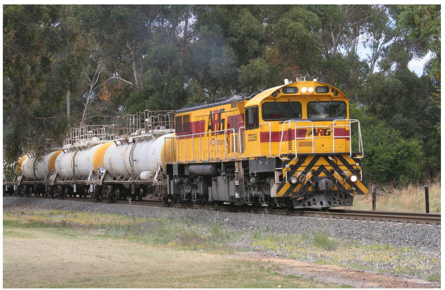
DD2359 on caustic tankers at Roelands November 27th.