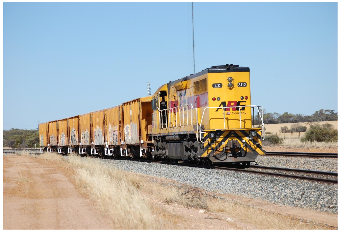
LZ3112 on 2B14 ballast train at Moorine Rock November 19th.