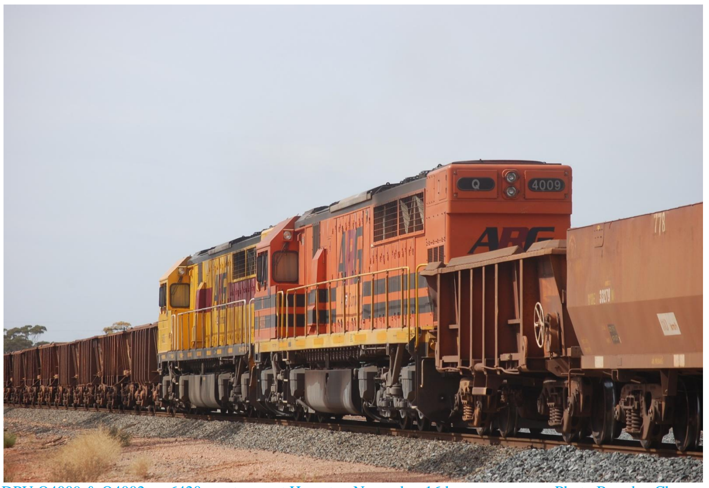
DPU Q4009 & Q4002 on 6420 empty ore at Hampton November 16th.