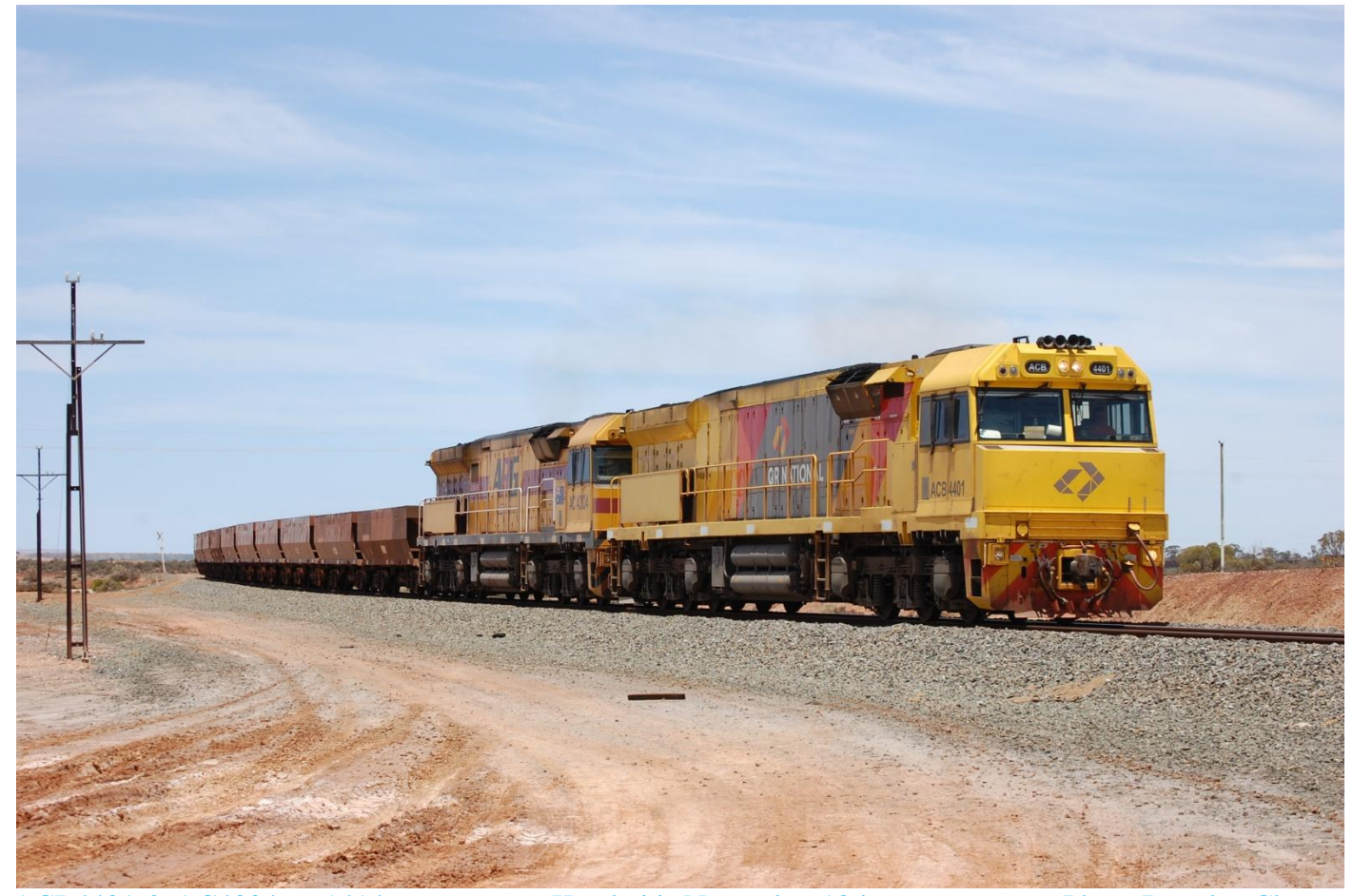
ACB4401 & AC4304 on 1414 empty ore at Kambalda November 18th.