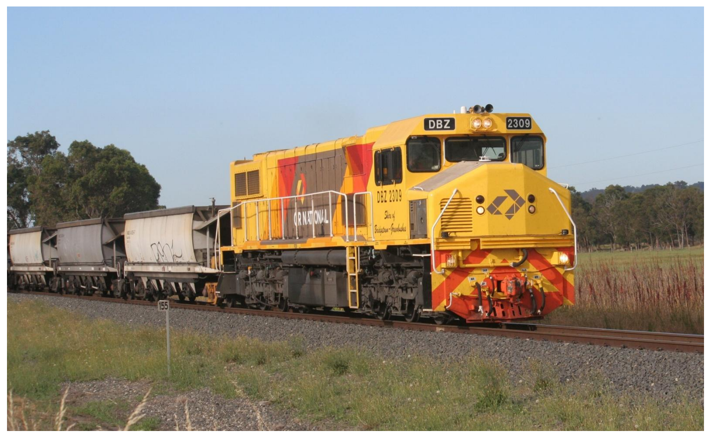
DBZ2309 on empty coal train north of Brunswick November 26th.