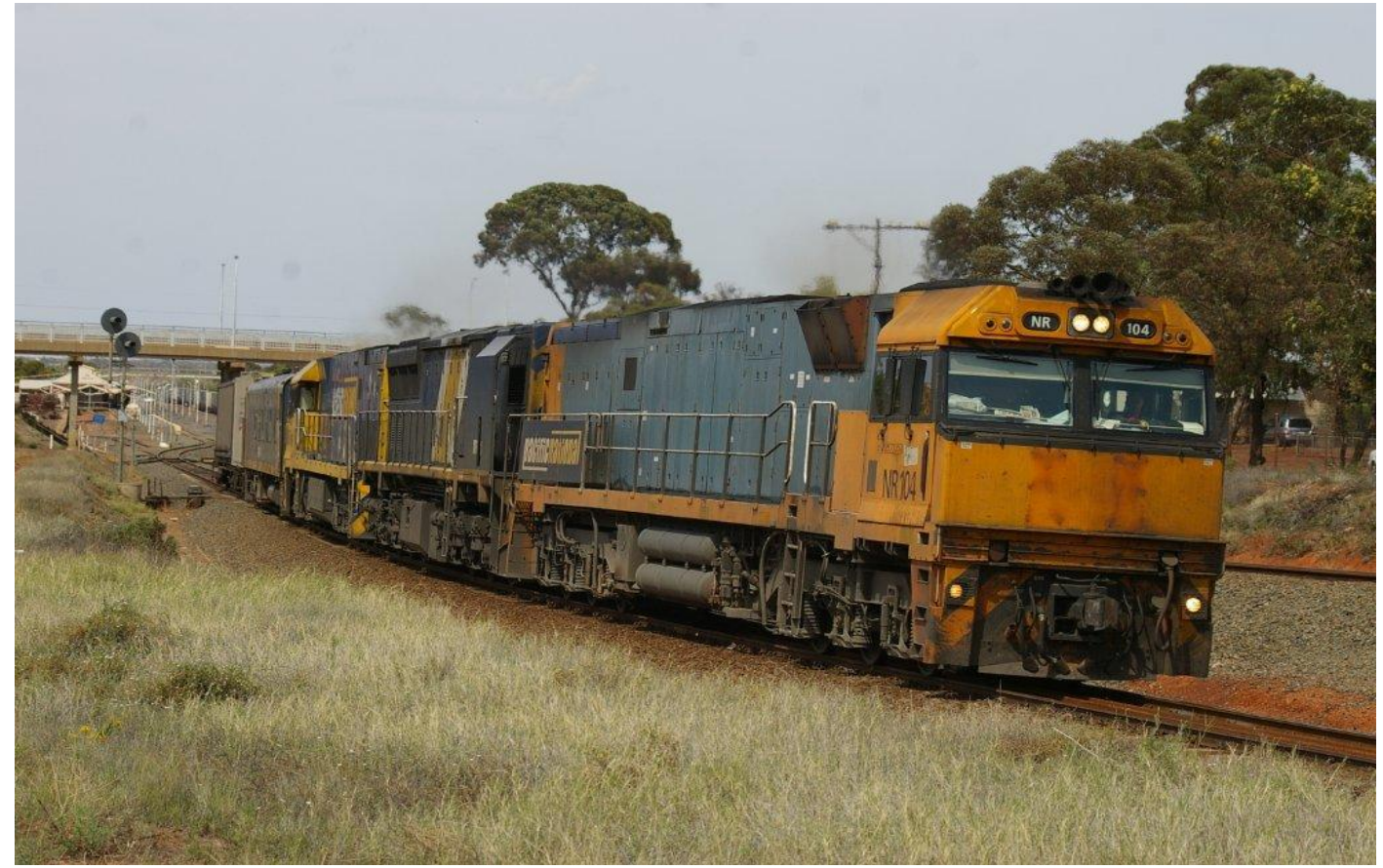
NR104, XRB561 & NR67 on 6PM7 express passing under the Maritana Street Bridge with Kalgoorlie Station in the background November 24th.