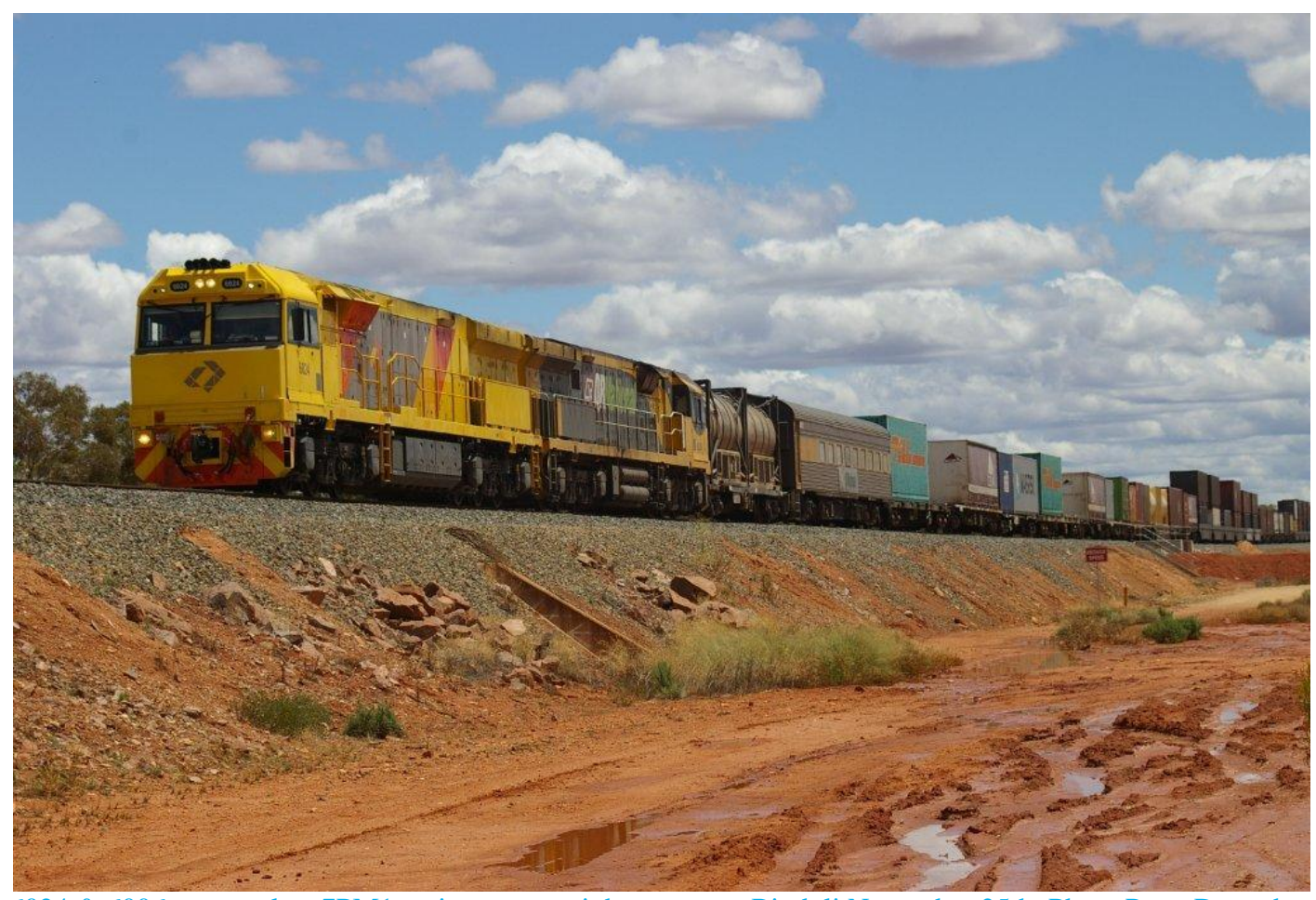
6024 & 6006 on very late 7PM1 owing to overnight storms at Binduli November 25th.