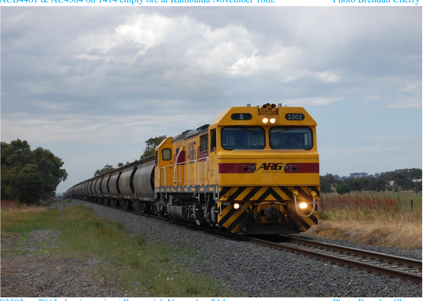
S3302 on 7865 alumina train at Brunswick November 24th.