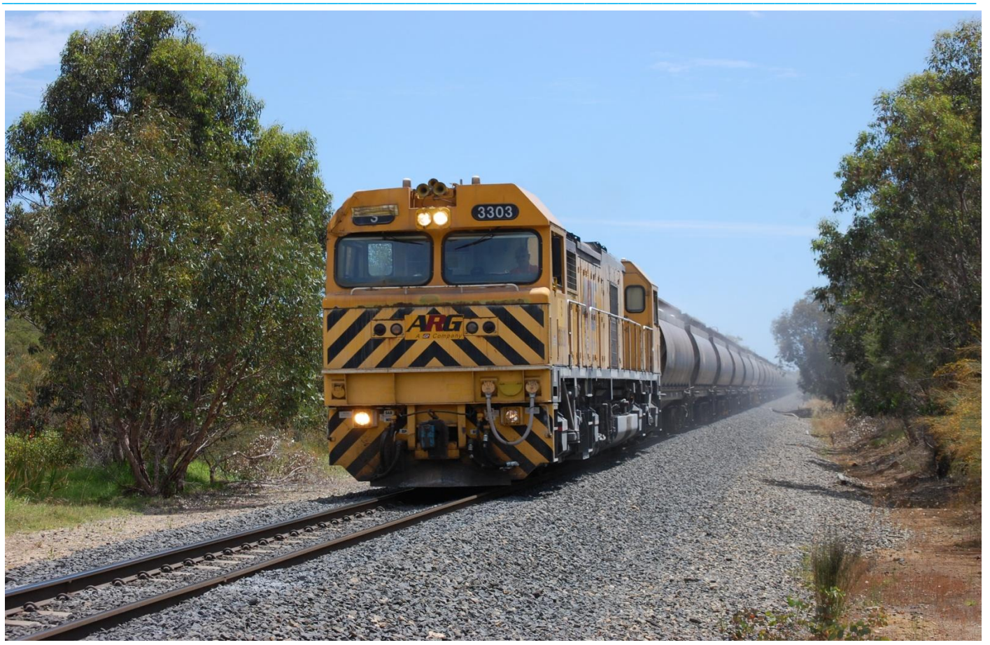
S3303 on 7813 alumina train at Waterloo on November 24th.

SCT014 that failed on a Watco service mid November being first stored at Avon Yard, then at Forrestfield was hauled out dead November 25th on 1PM9 SCT freight to Adelaide. This short term hire of SCT locomotive to run CBH/Watco services has ended with arrival of CBH118 and CBH120.