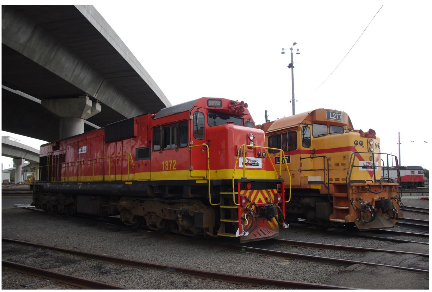
Ex Westrail NB 1872 with ex Comalco L277 at Dynon s/g turntable Melbourne 16/11.