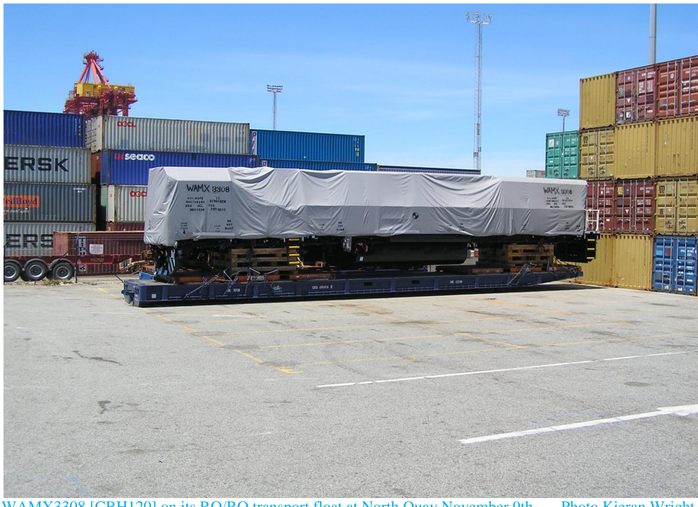
WAMX3308 [CBH120] on its RO/RO transport float at North Quay November 9th.