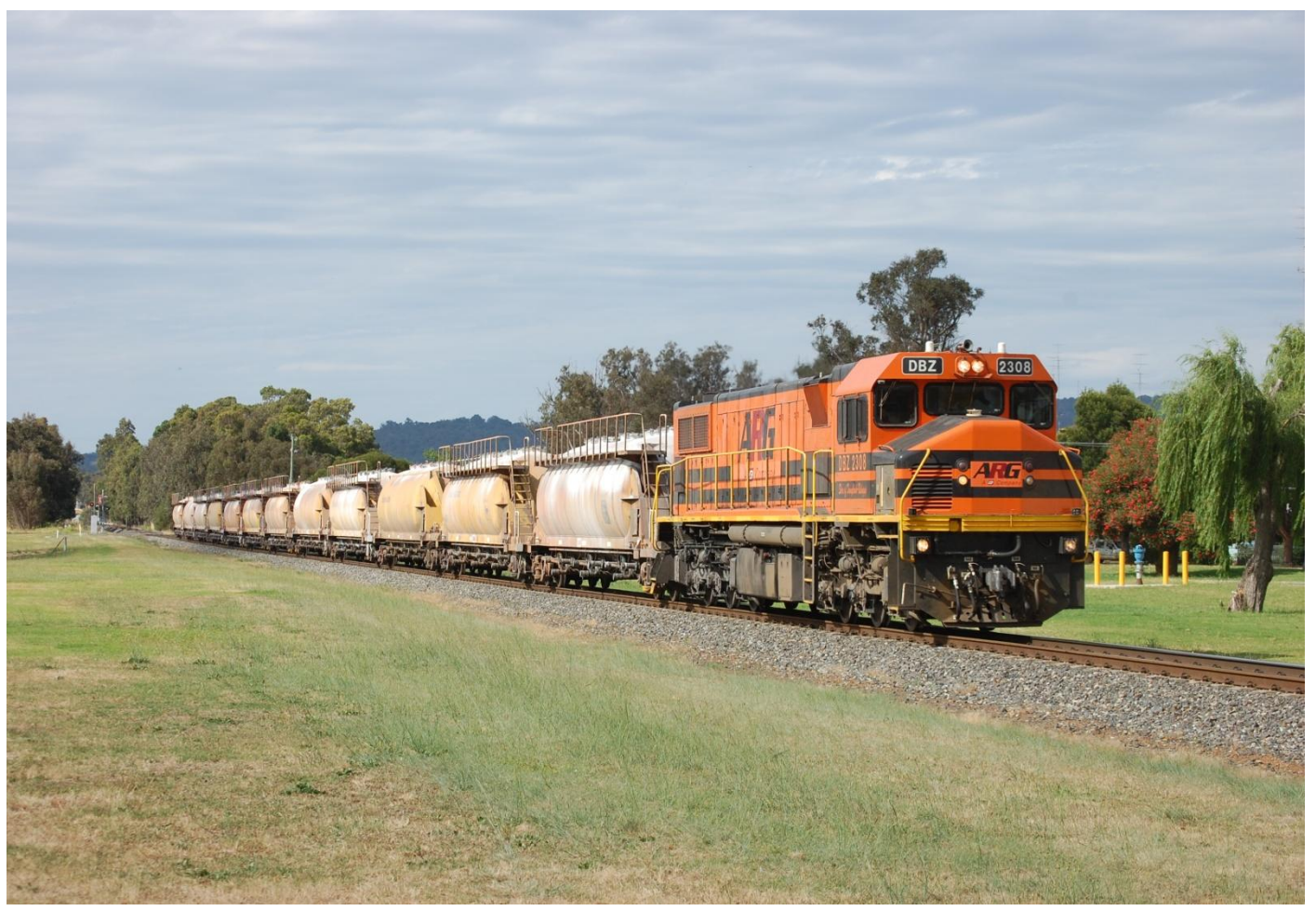
DBZ2308 on 7271 lime train at Harvey November 24th.