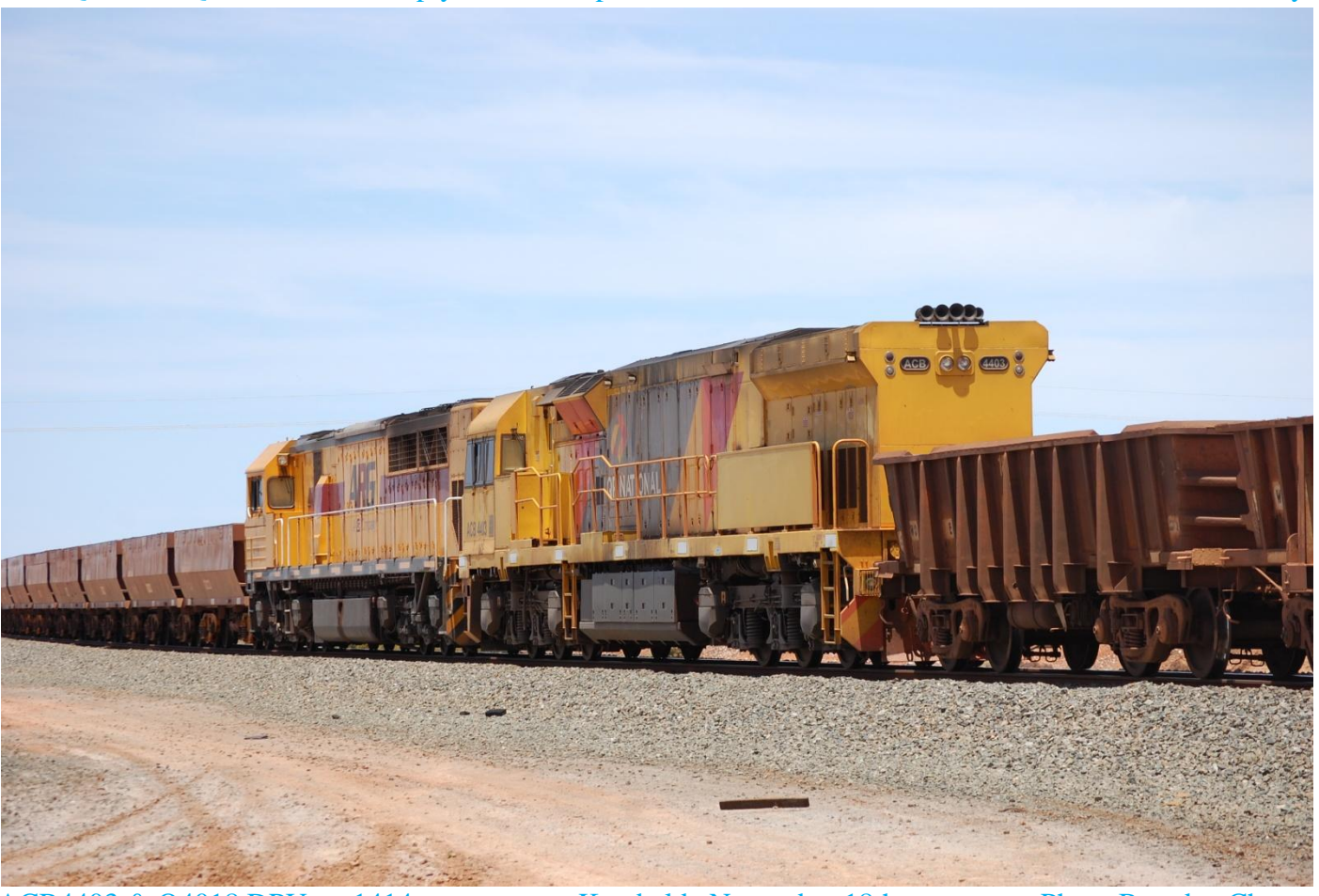
ACB4403 & Q4018 DPU on 1414 empty ore at Kambalda November 18th.