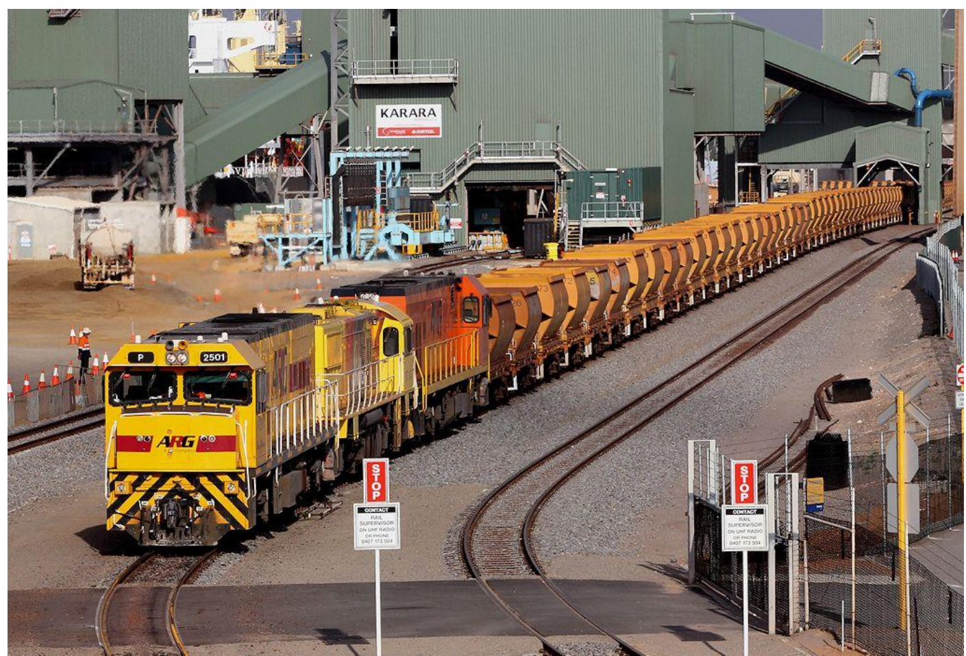
P2501, DFZ2402 & P2516 unloading 7722 ore at Port of Geraldton November 24th.