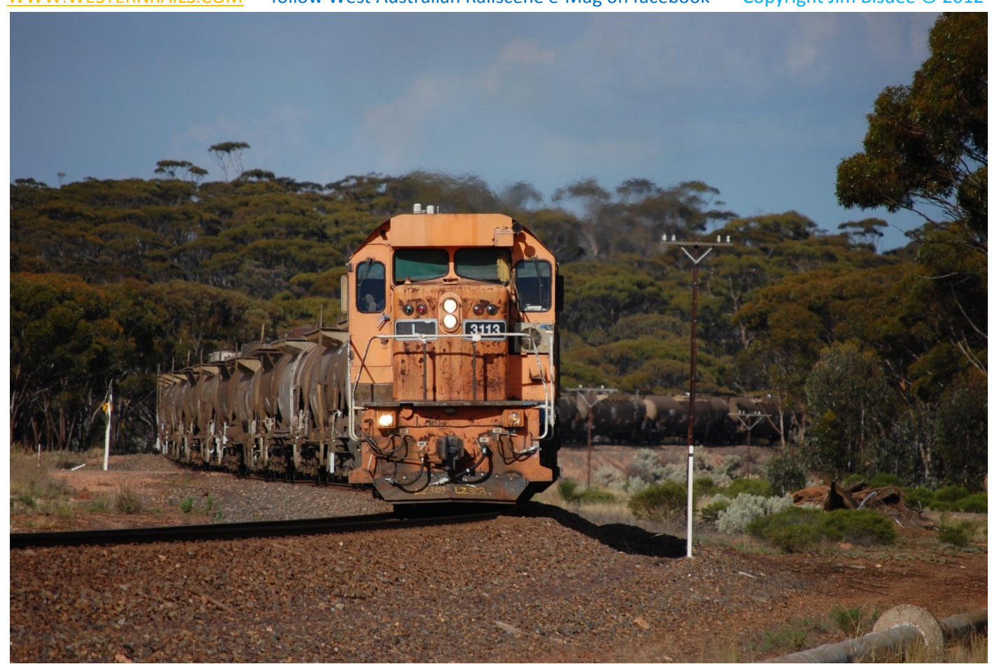
L3113 leading L3118 on 1142 fuel train through S curves at Cowan November 18th.

West Australian Railscene e-Mag is published weekly by Jim Bisdee on rail happenings on West Australian Railroads WWW.WESTERNRAILS.COM follow West Australian Railscene e-Mag on facebook Copyright Jim Bisdee © 2012