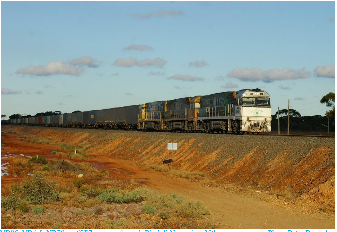
NR85, NR6 & NR78 on 6SP7 express through Binduli November 25th.