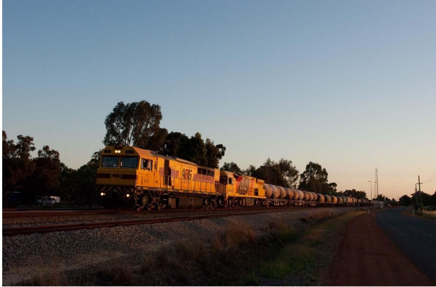
Q4012 & ACB4405 on 1025 Kalgoorlie freight at Millendon November 25th.