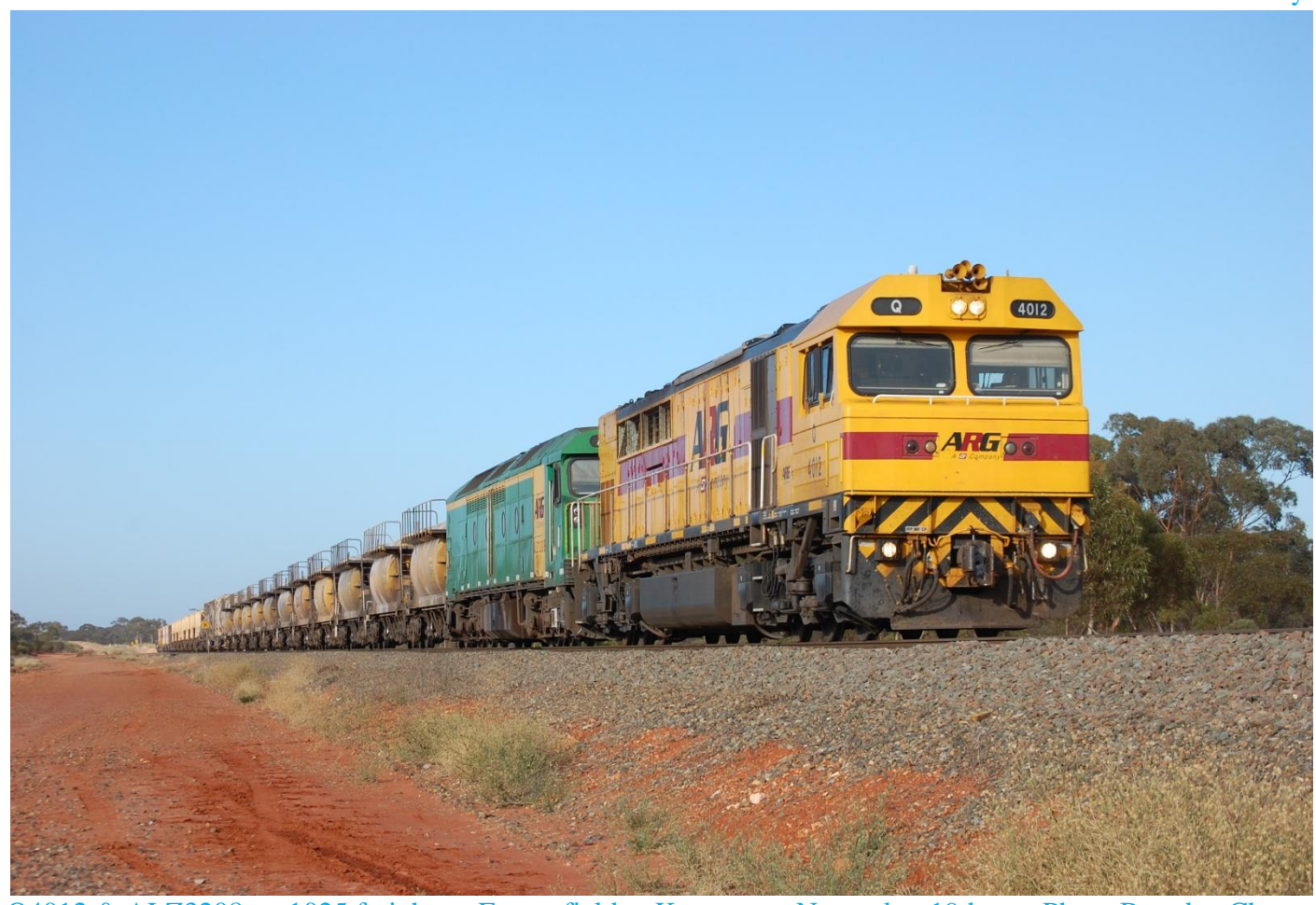
Q4012 & ALZ3208 on 1025 freight ex Forrestfield at Kurrawang November 19th.