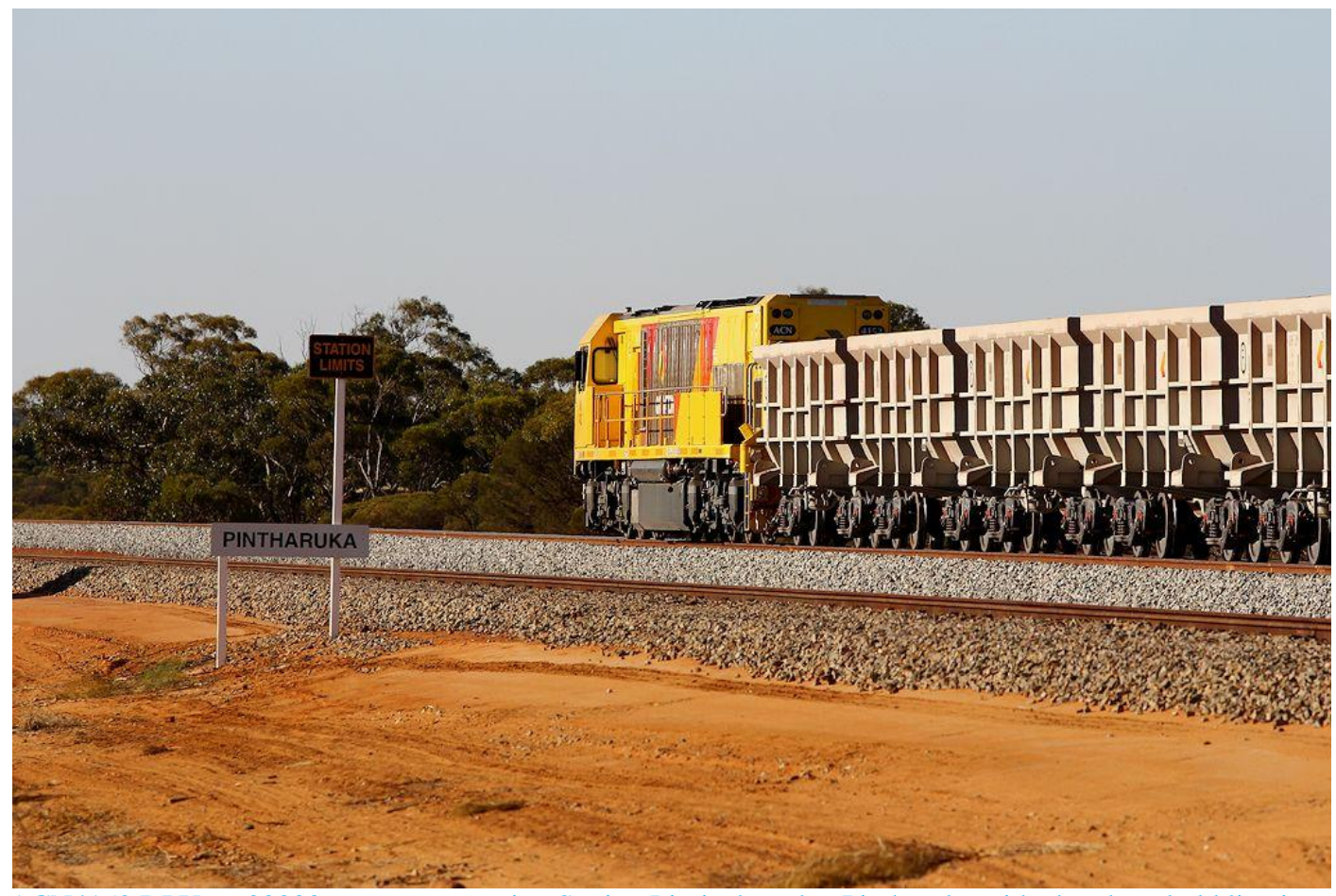
ACN4152 DPU on 00000 empty ore passing Station Limits board at Pintharuka with abandoned old line in the foreground on November 17th.