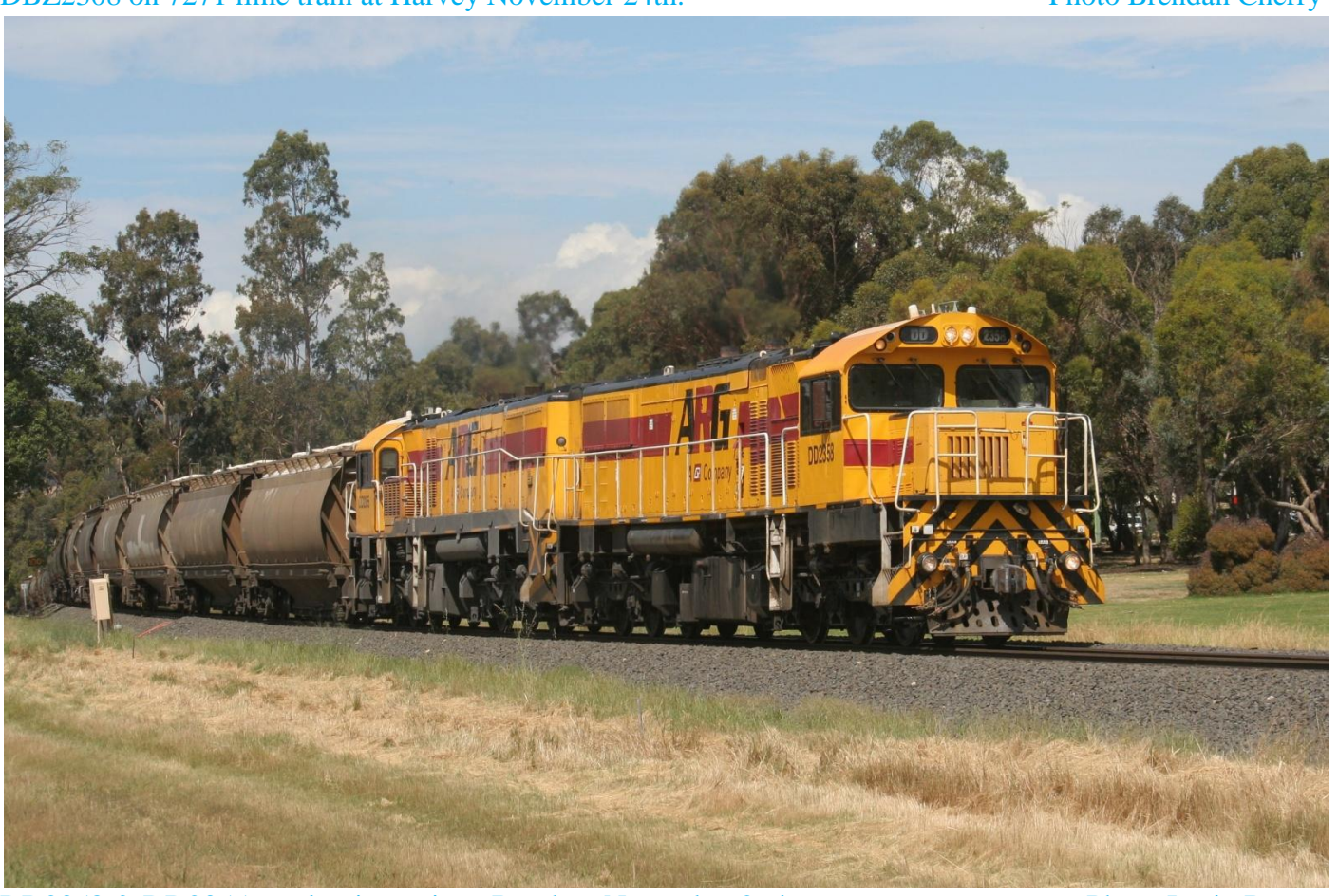
DD2358 & DD2355 on alumina train at Burekup November 26th.