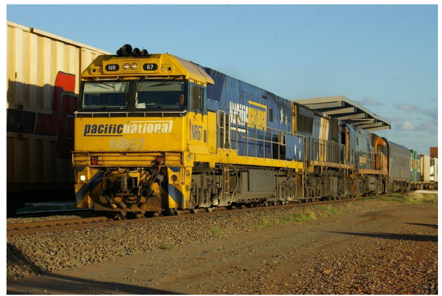
NR67, XRB561 & NR104 on 2MP5 intermodal at Parkeston November 28th.