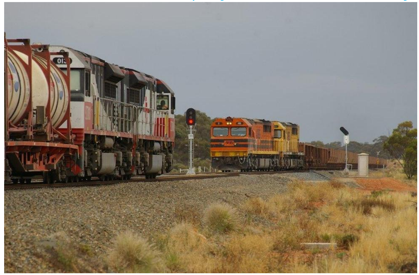
SCT008 & SCT013 on 5MP9 SCT freight in usual move of crossing Q4001 & Q4011 on 7415 ore train as it crosses over at Binduli to Esperance line November 24th.