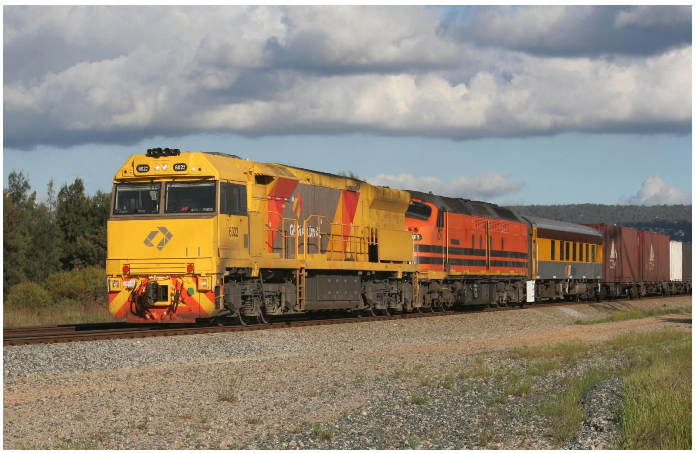
6022 & CLF1 run 2PM1 QRN intermodal at Toodyay Road Stratton October 15th.