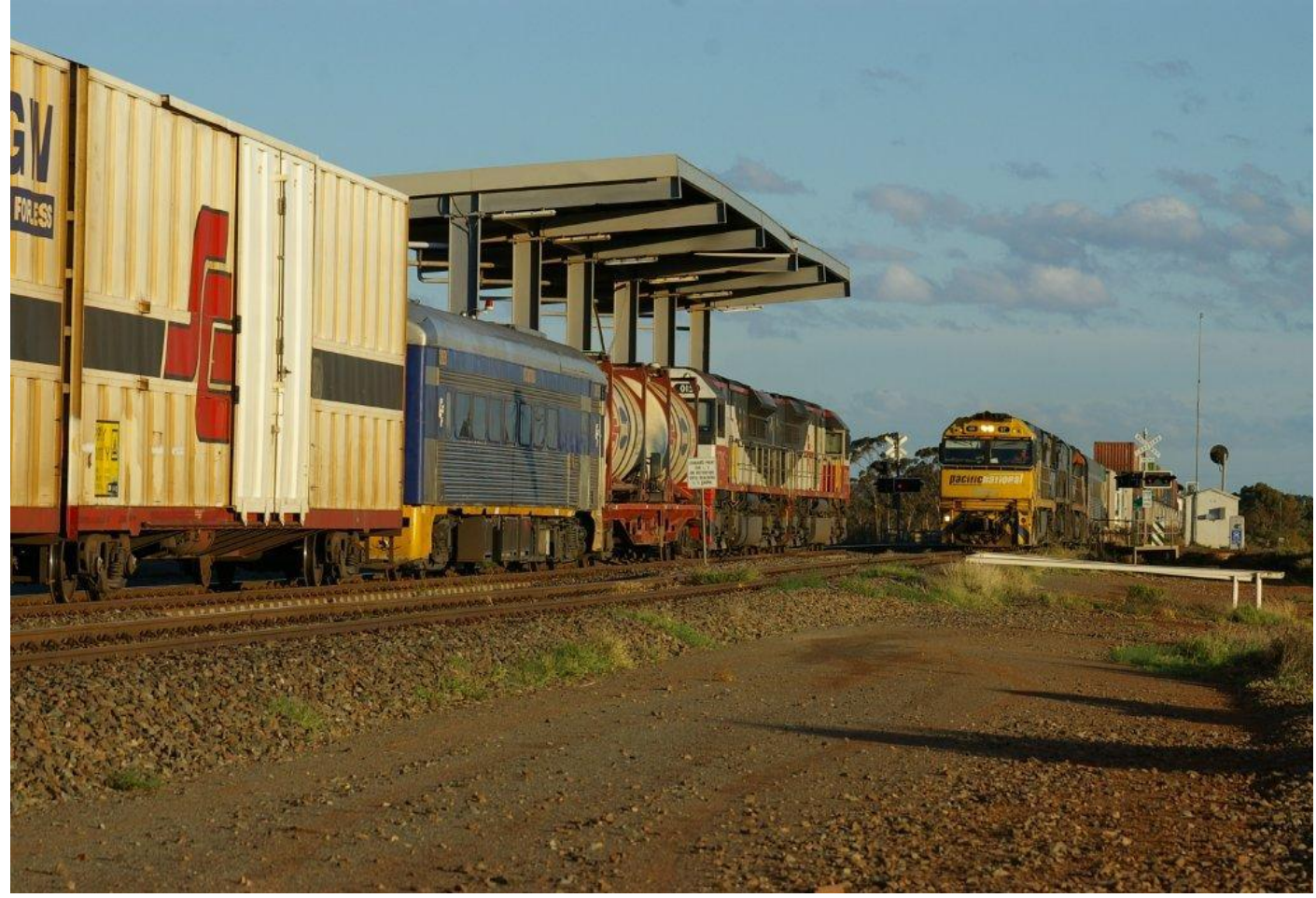
SCT012 & SCT015 on late 3PG1 SCT Parkes service at Parkeston crossing NR67, XRB561 & NR104 on 2MP5 National Rail intermodal with rare use of XRB to WA November 28th.