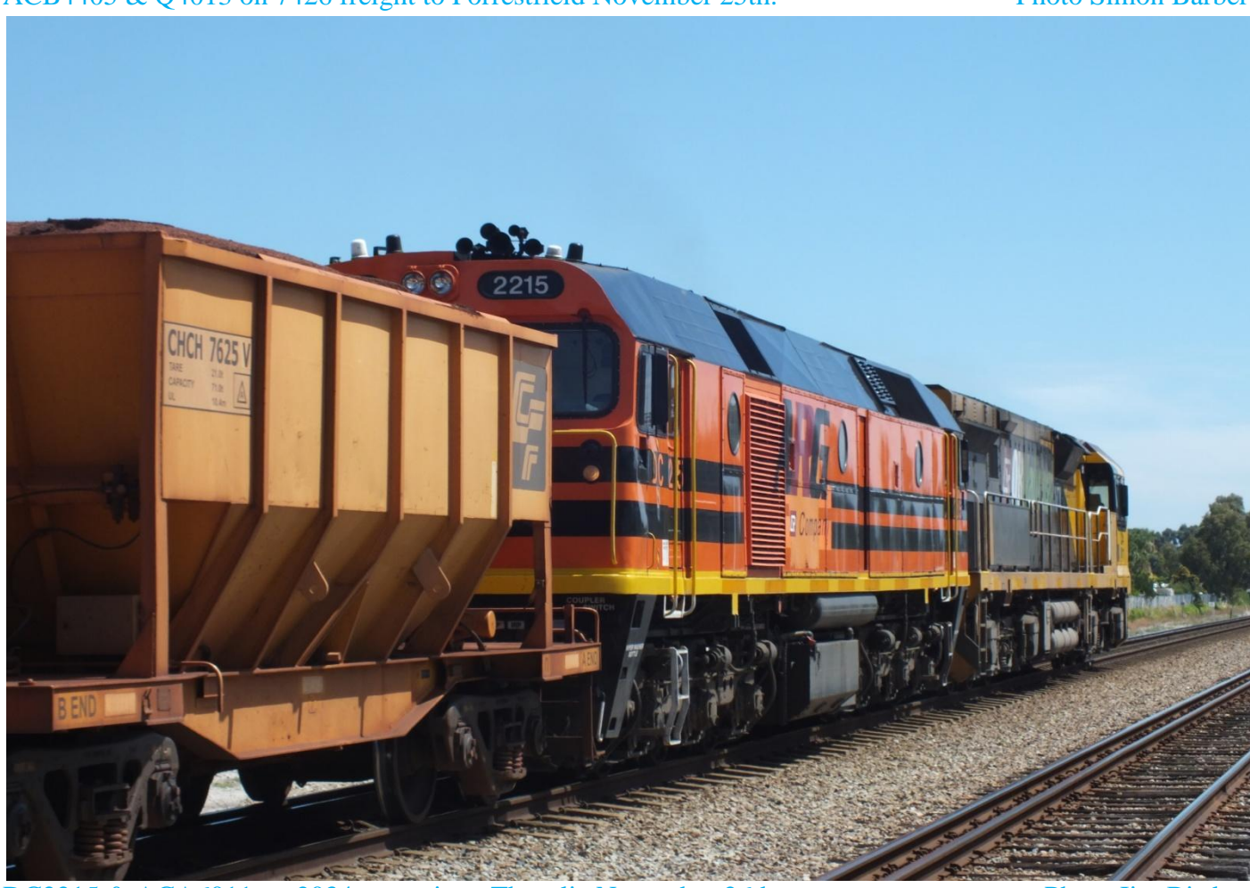
DC2215 & ACA6011 on 2034 ore train at Thornlie November 26th.