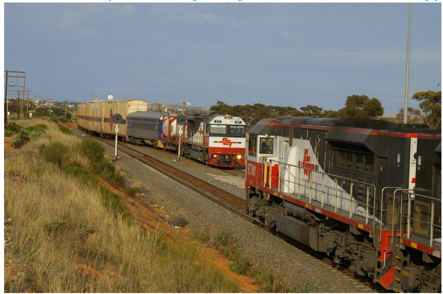
SCT001 & SCT010 on very late 2PM9 SCT freight crossing SCT007 on 2AP9 on SCT special Adelaide to Perth freight on a rare cross at West Kalgoorlie November 27th.