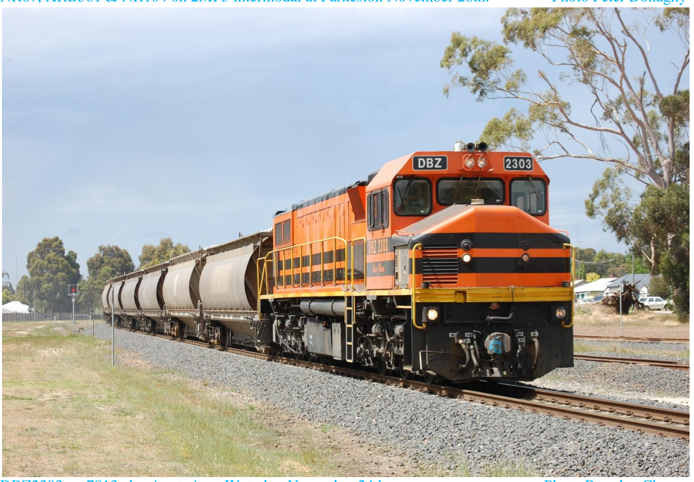
DBZ2303 on 7813 alumina train at Waterloo November 24th.