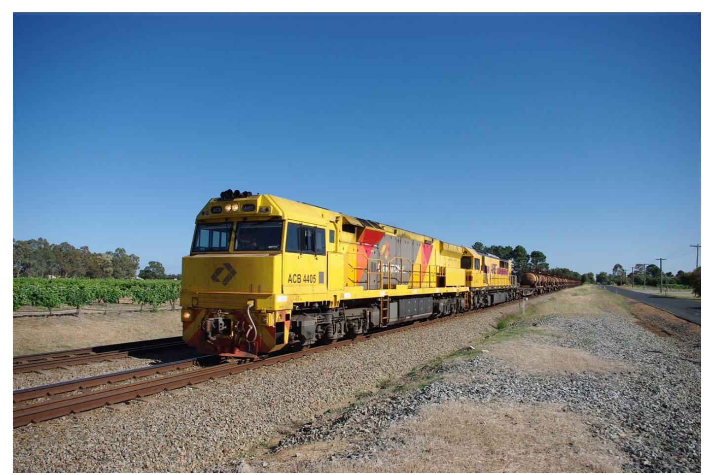
ACB4405 & Q4013 on 7426 freight to Forrestfield November 25th.