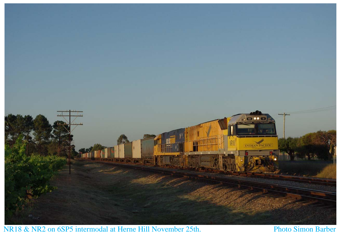
NR18 & NR2 on 6SP5 intermodal at Herne Hill November 25th.