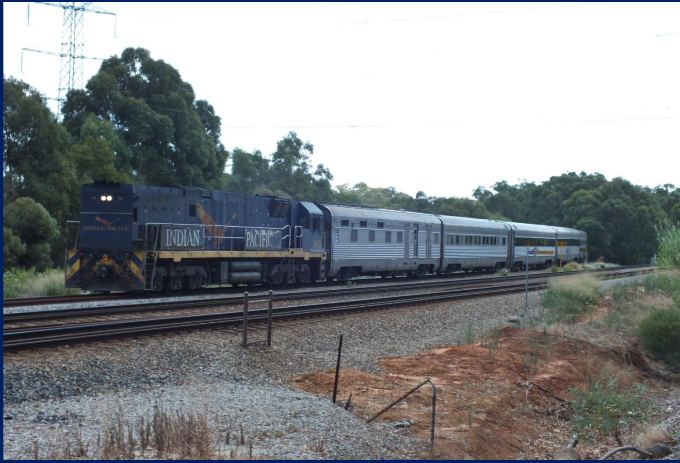
NR26 on 7003 empty Indian Pacific coaches to P/N Kewdale at Woodbridge March 16th.