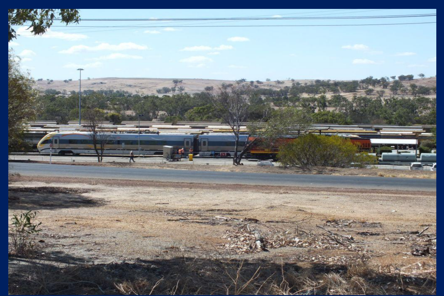
Prospector set being serviced at Avon Loco Northam owing to fire closing line to west 1/3.