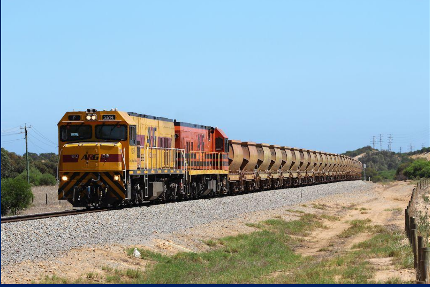
P2514 & P2503 on empty Mt Gibson ore from port at Narngulu West March 17th.