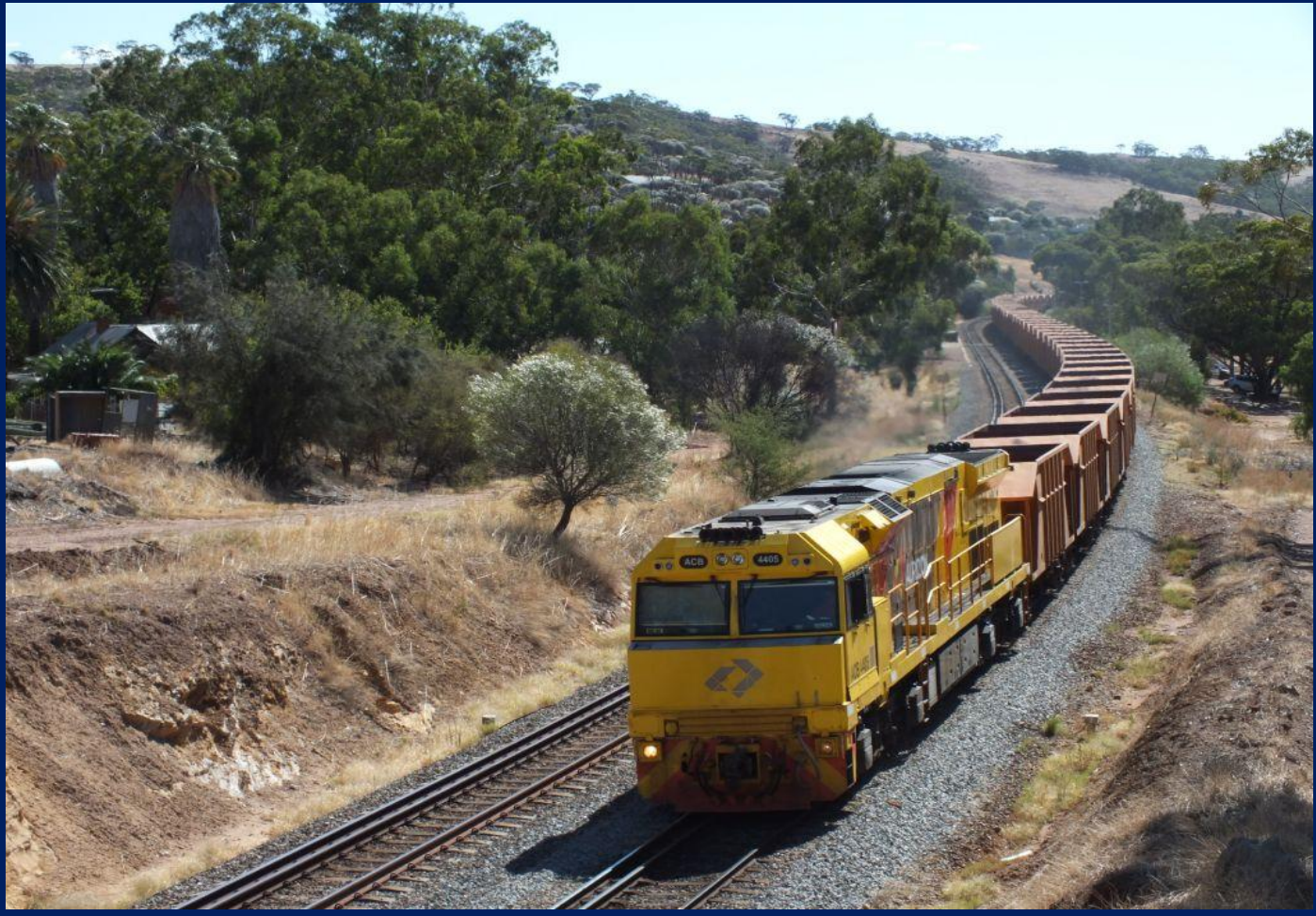
ACB4405 hauls 5033 empty ore blamed for starting fire 28/2, thru Toodyay 1/3.