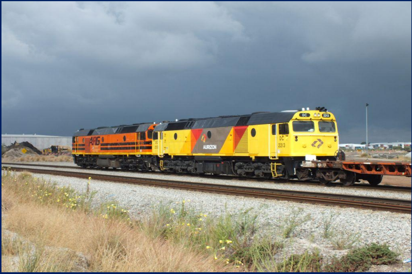
DC2215 & DC2213 on 2142 container train departing Forrestfield March 11th.