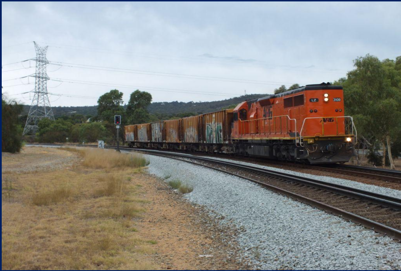
LZ3109 on 1BT2 empty ballast train at Bellevue March 10th.