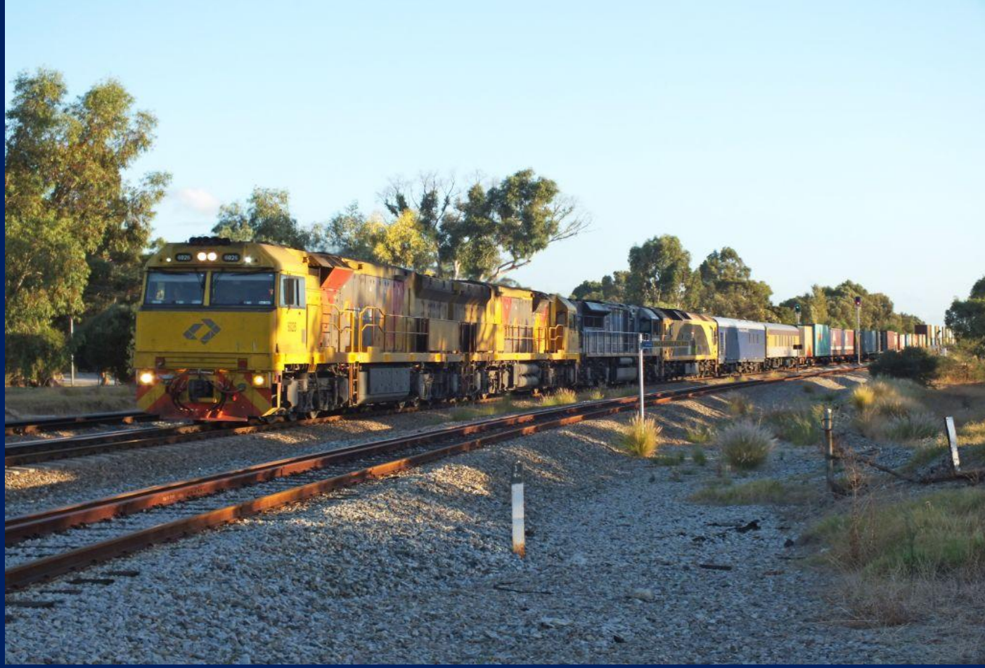
6026, 6023, dead LDP001 & G534 on 2PM1 combined 7PM1/2PM1 Woodbridge March 4th.