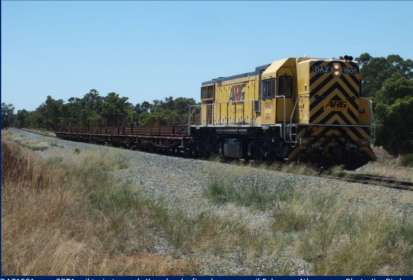
DAZ1901 runs 2RT1 rail train towards Keysrbook after droppong rail February 4th.