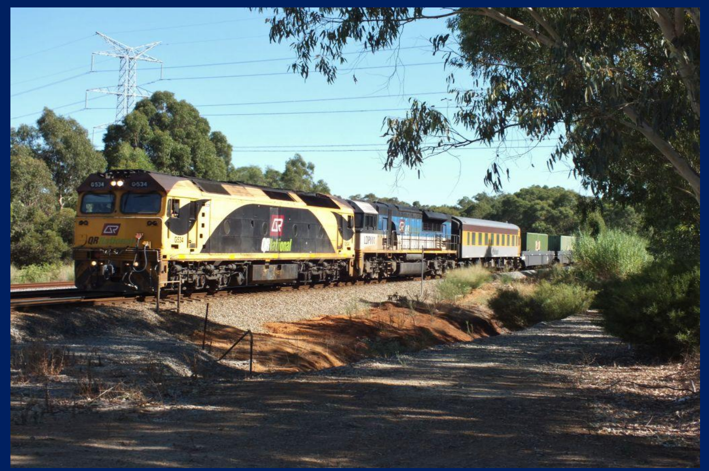
G534 & LDP001 hauls 5MP1 Aurizon intermodal down Woodbridge triangle March 3rd.