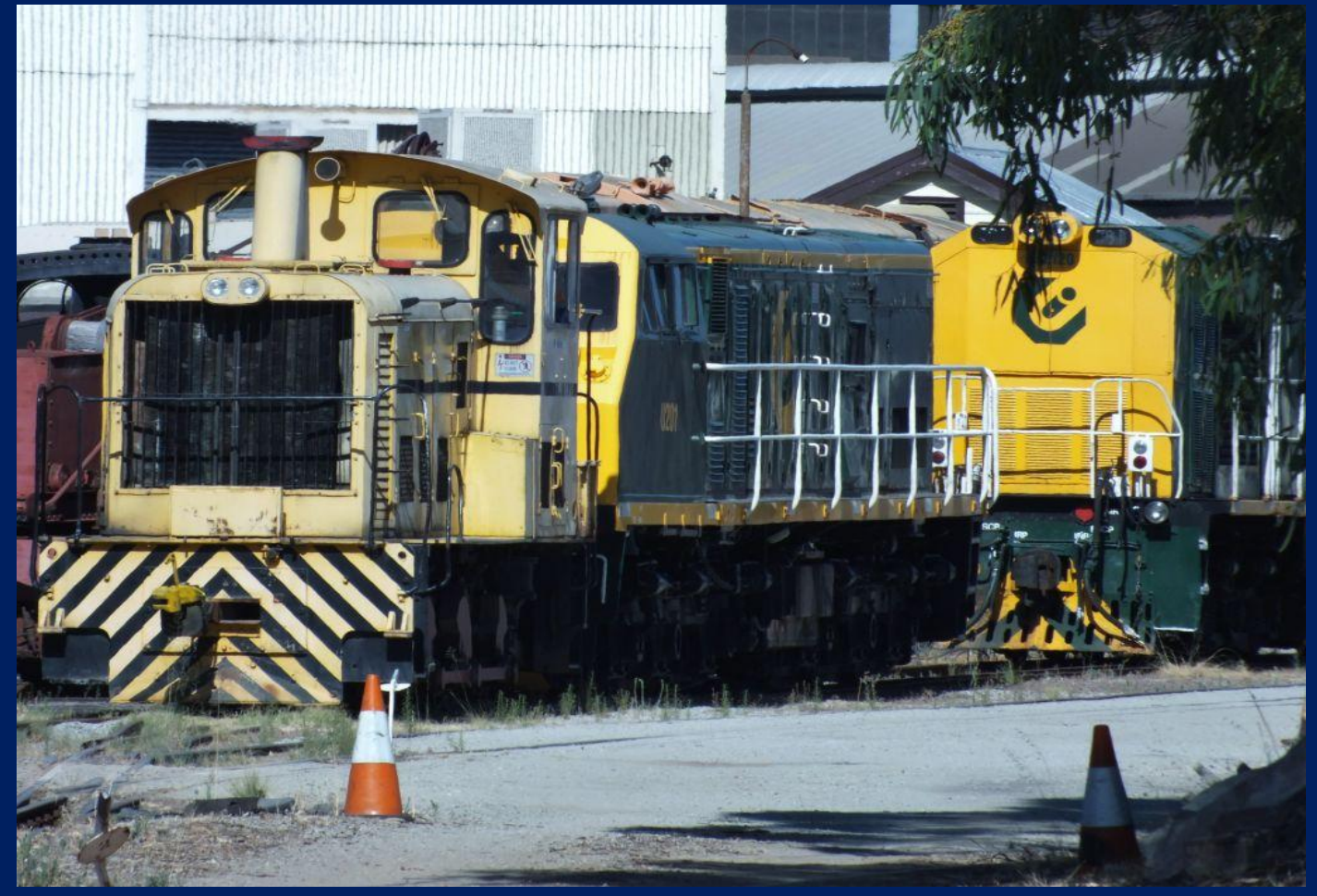
UGR TA shunter shunts U201 off ZB2120 in UGR siding Bassendean Febraury 16th.