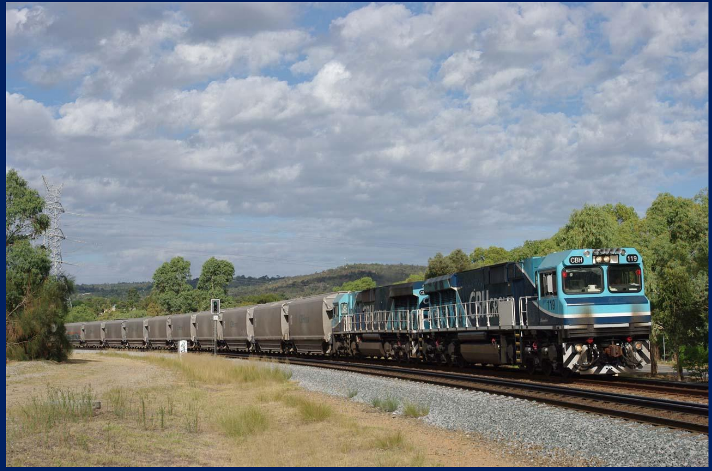
CBH119 & CBH121 on 7S56 Watco grain at Bellevue March 16th.