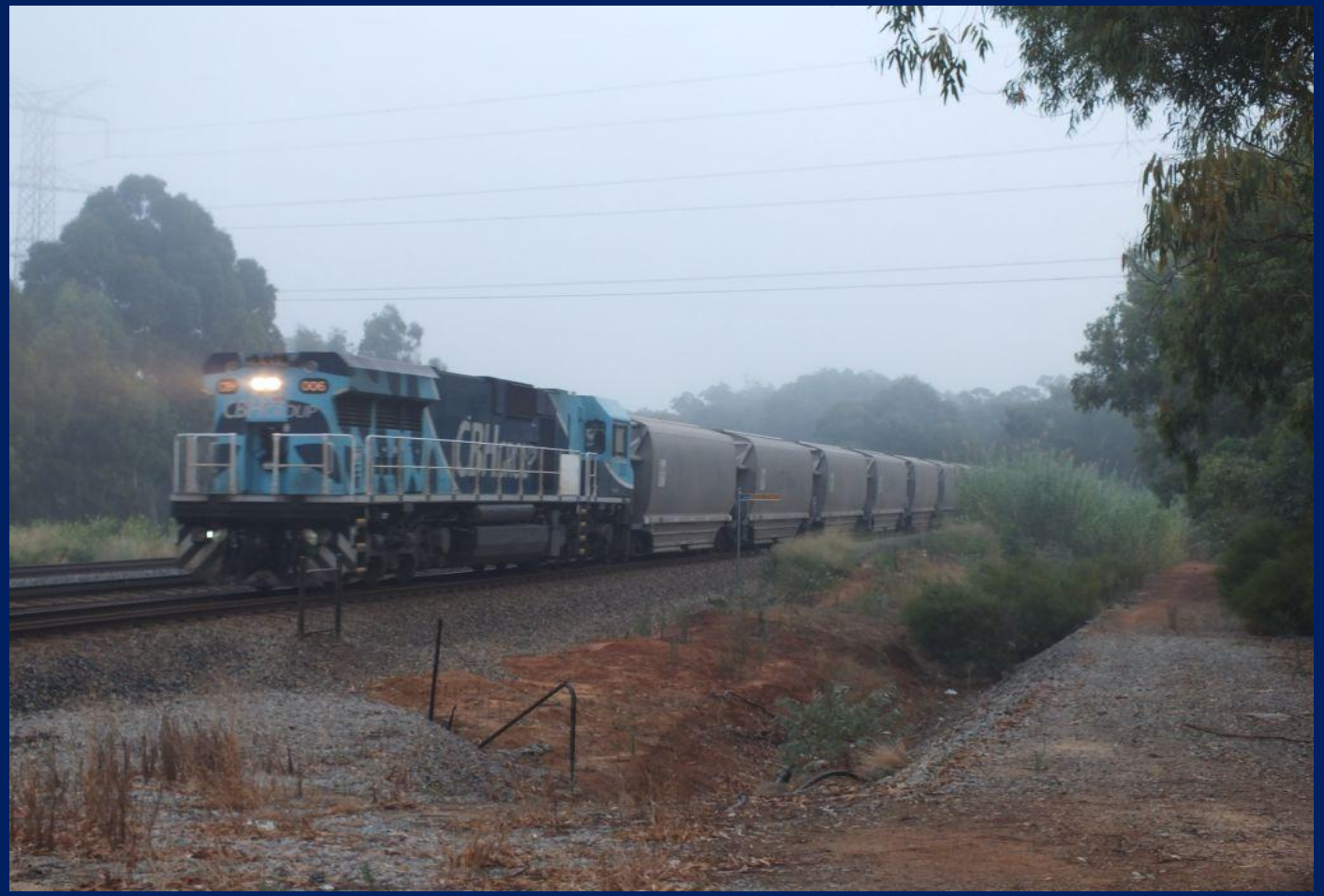
CBH006 on 3K74 Watco grain in the mist on east leg of Woodbridge triangle March 19th.