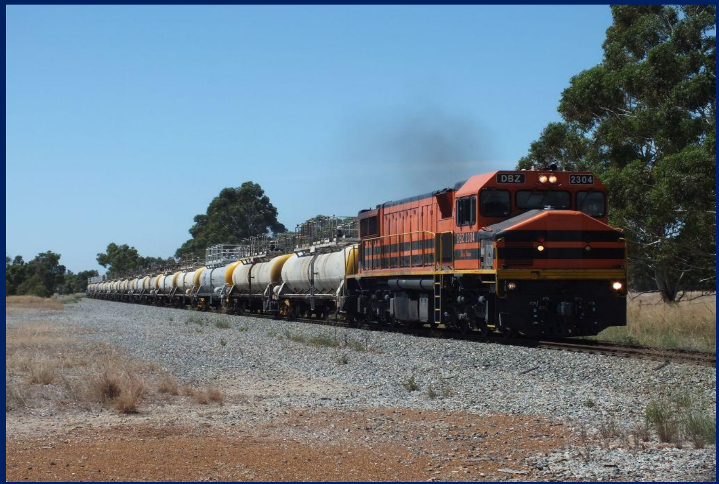
DBZ2304 on caustic tankers Kwinana to Calcine with four new tankers at Keysbrook 4/2.