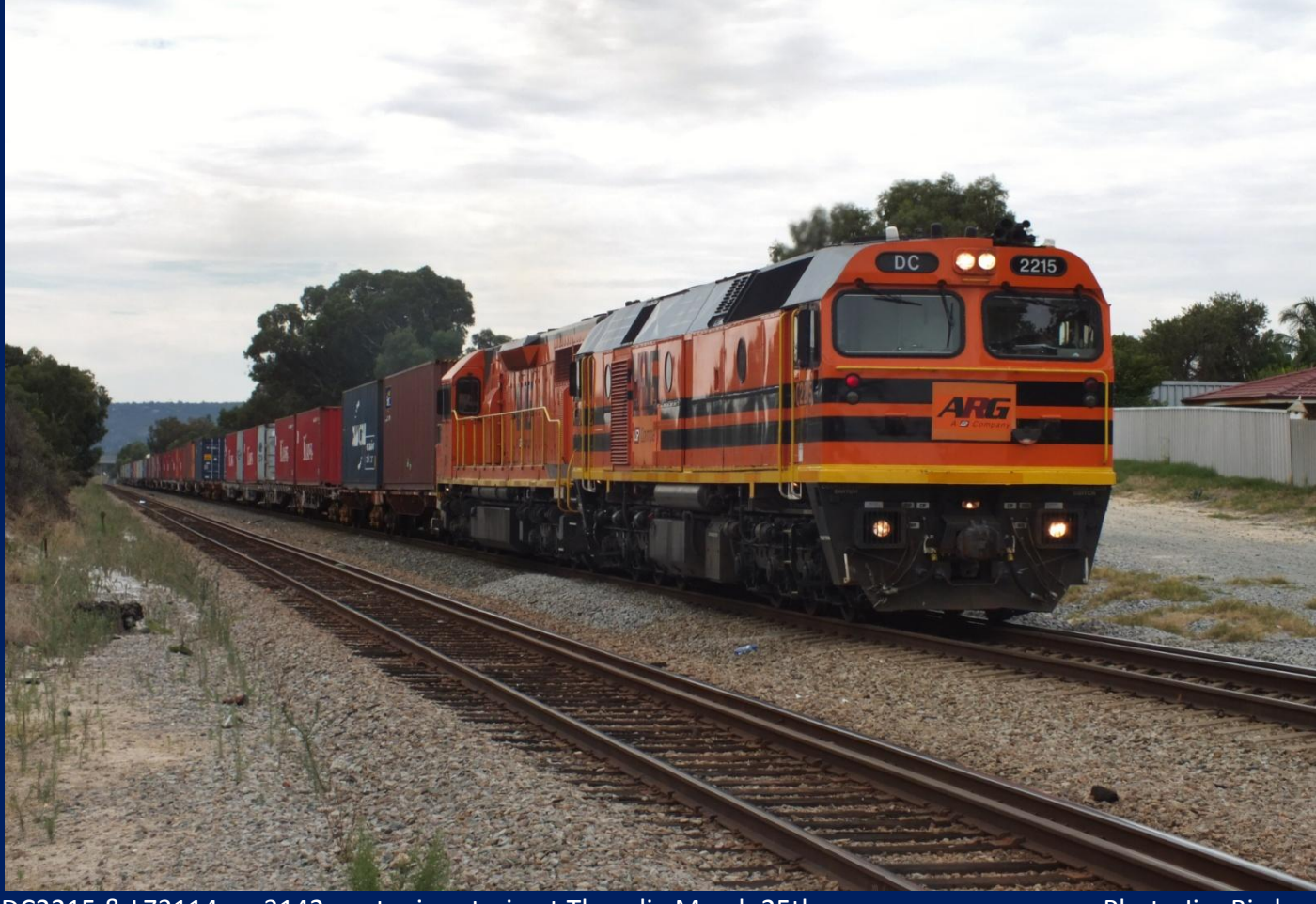
DC2215 & LZ3114 on 3142 contauiner train at Thornlie March 25th.