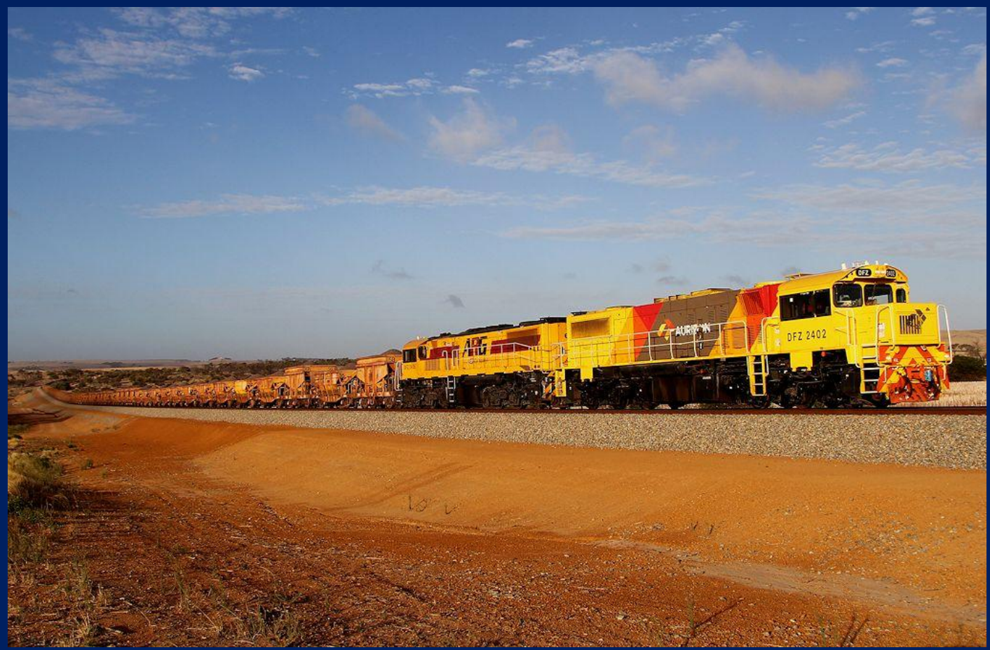
DFZ2402 & DFZ2405 Mt Gibson ore with old and new wagons at Mickos Fill 17/2.