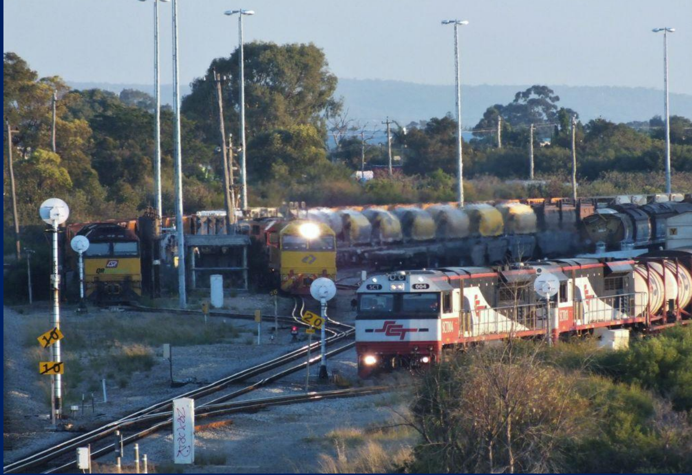
SCT004 & SCT014 on 1PM9 SCT freight departing Forrestfield with 1025 freight and ore stabled 17/3. JB