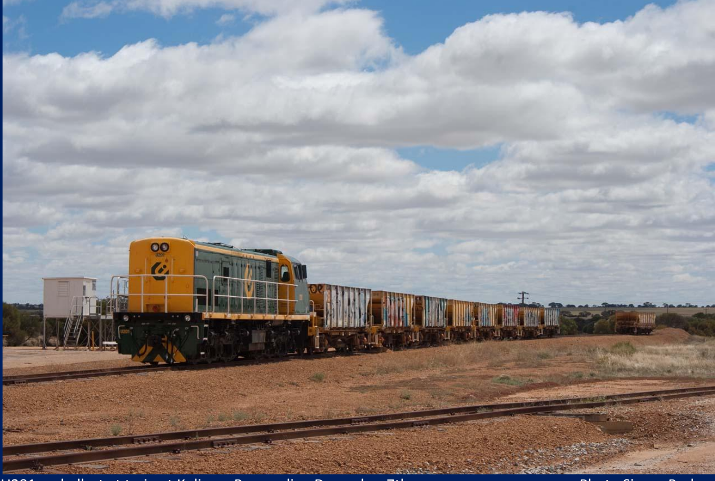
U201 on ballast at train at Kulja on Baecon line December 7th.