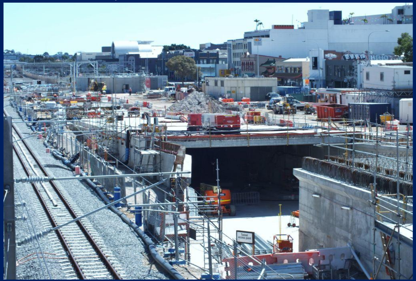
Progress on building Fremantle line tunnel with roof being built 29th March.