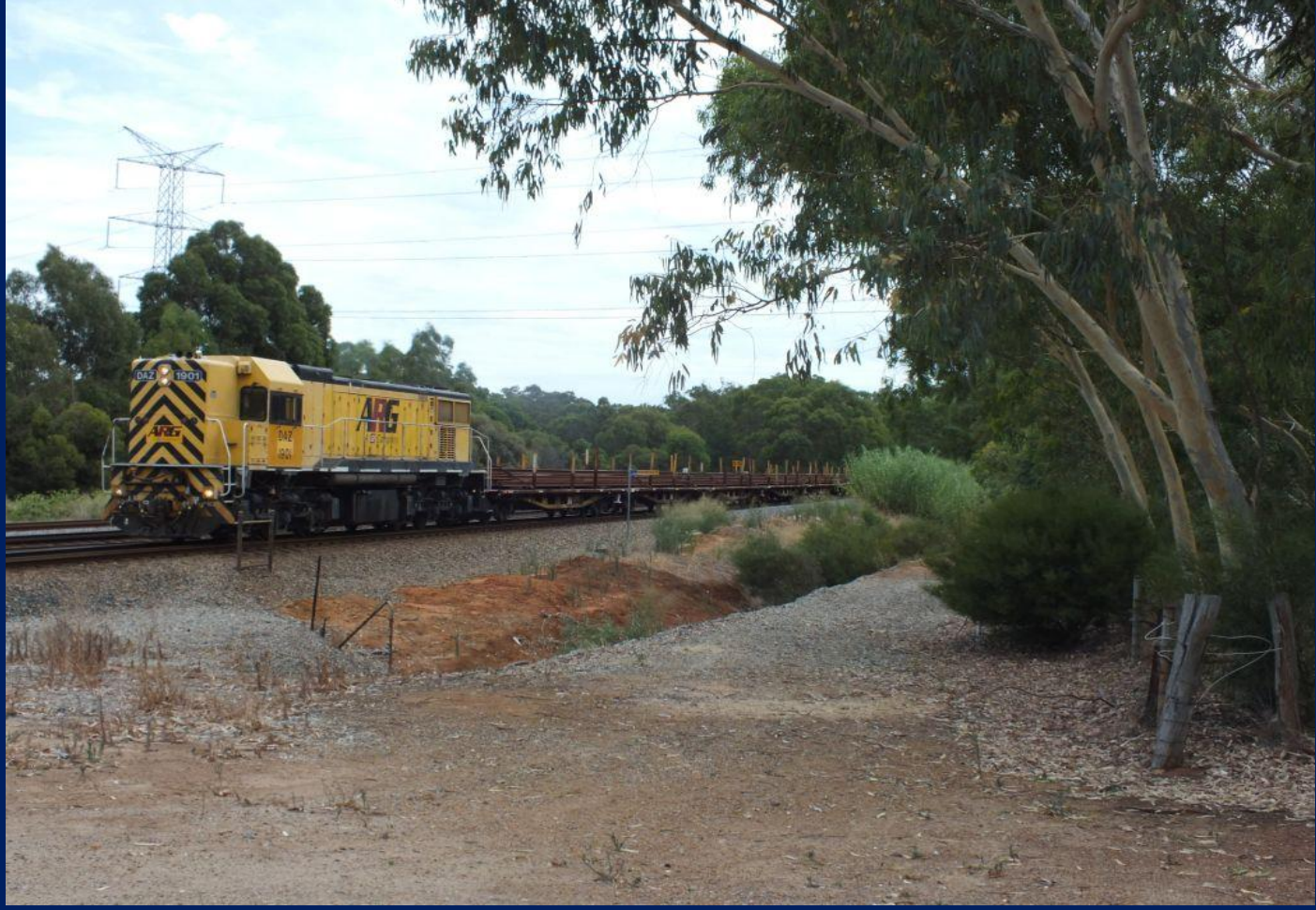
DAZ1901 on 2122 rail train on east leg of Woodbridge triangle Febraury 11th.