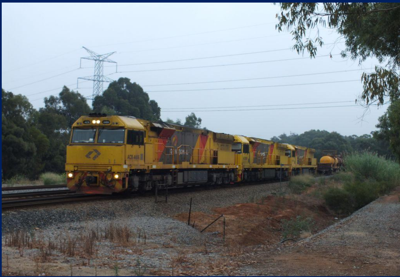
ACB4406, ACC6030 & ACC6031 on 2426 freight Forrestfield at Woodbridge March 19th.