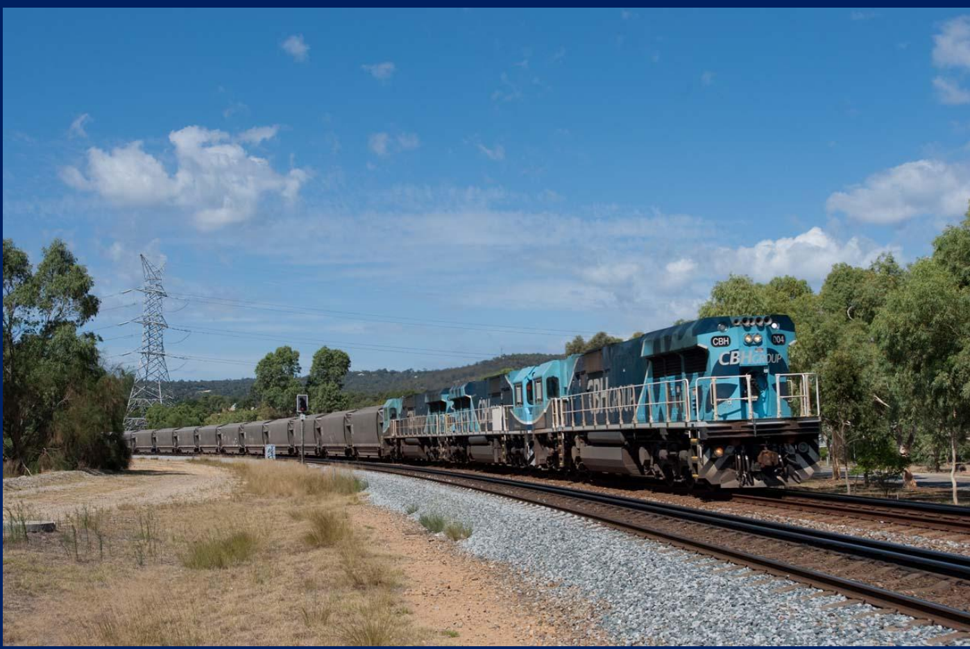
CBH004, CBH001 & CBH002 on 7K22 Watco grain at Bellevue March 16th.