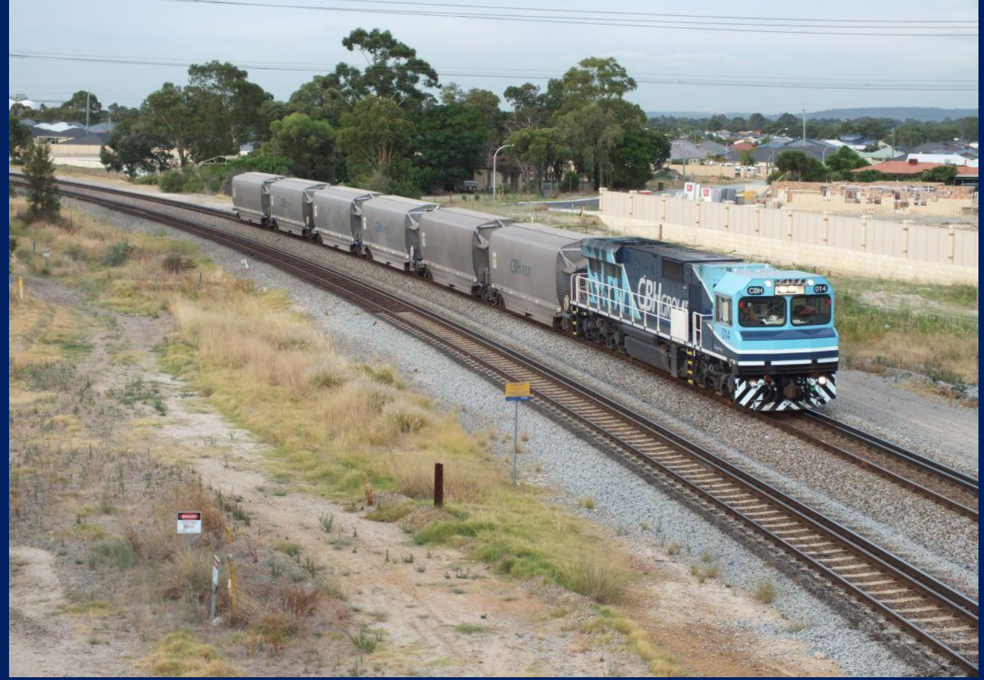
CBH014 hauls 3K08 three 2xpack CBHN wagons from a derailment thru Welshpool 12/2.