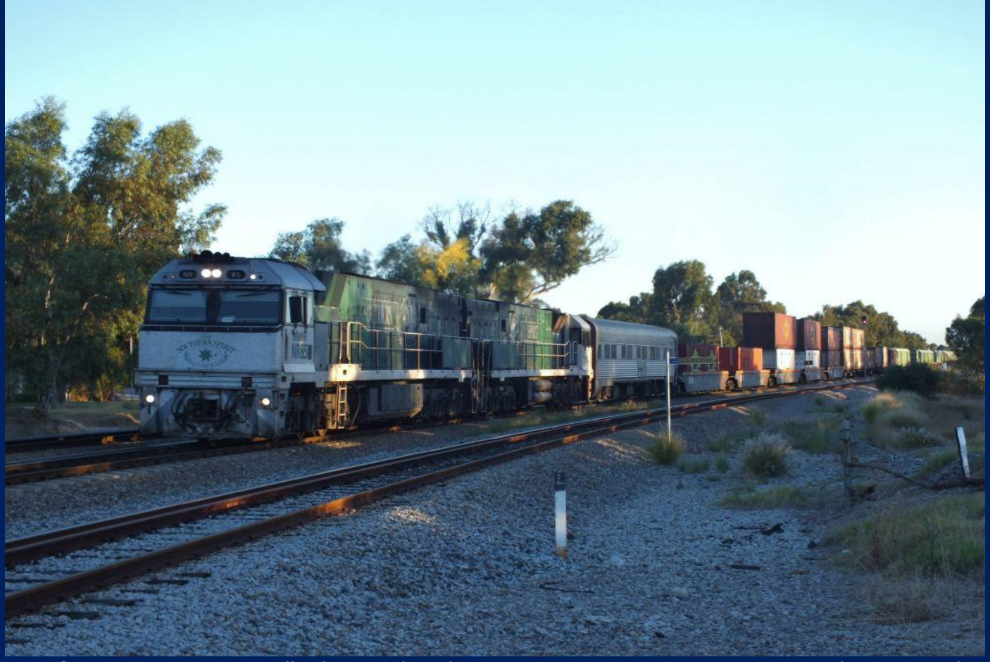
NR85 & NR84 on 3PS6 at Woodbridge March 12th.