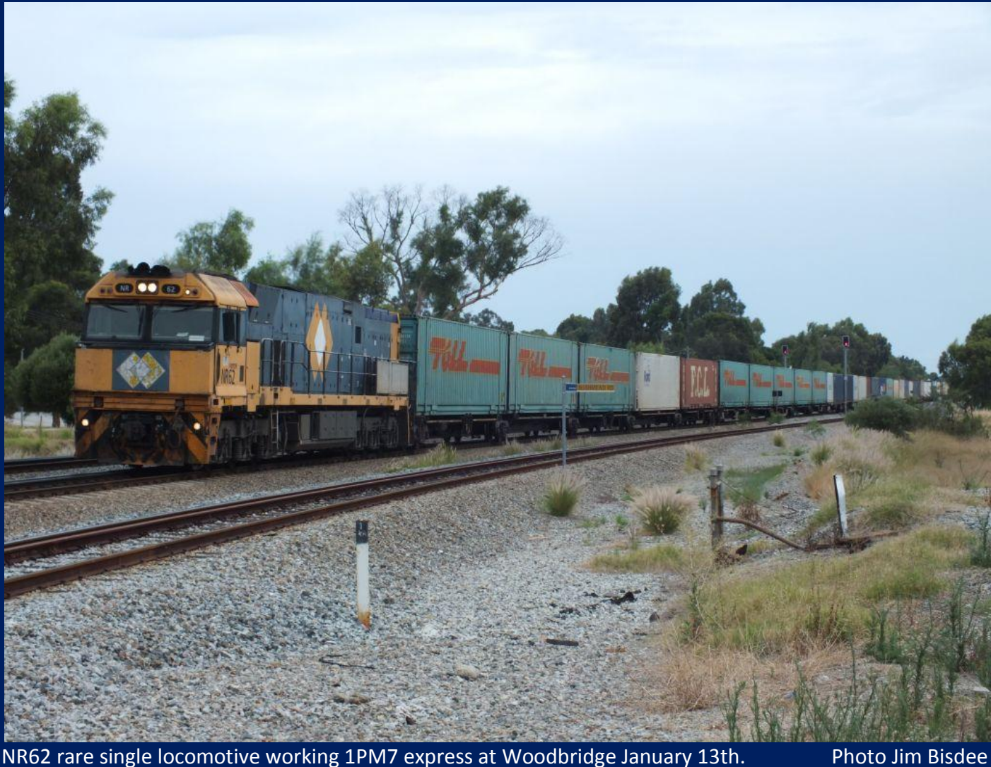
NR62 rare single locomotive working 1PM7 express at Woodbridge January 13th.

Next issue will cover April, May June 2013.