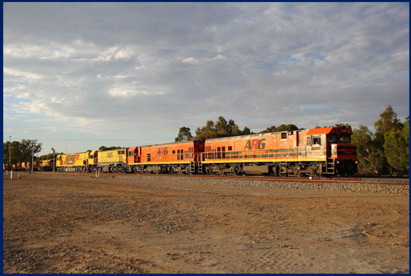
DAZ203, P2516, DAZ1903 & ACN4146 on 7754 light engines departing Narngulu yard 9/2.