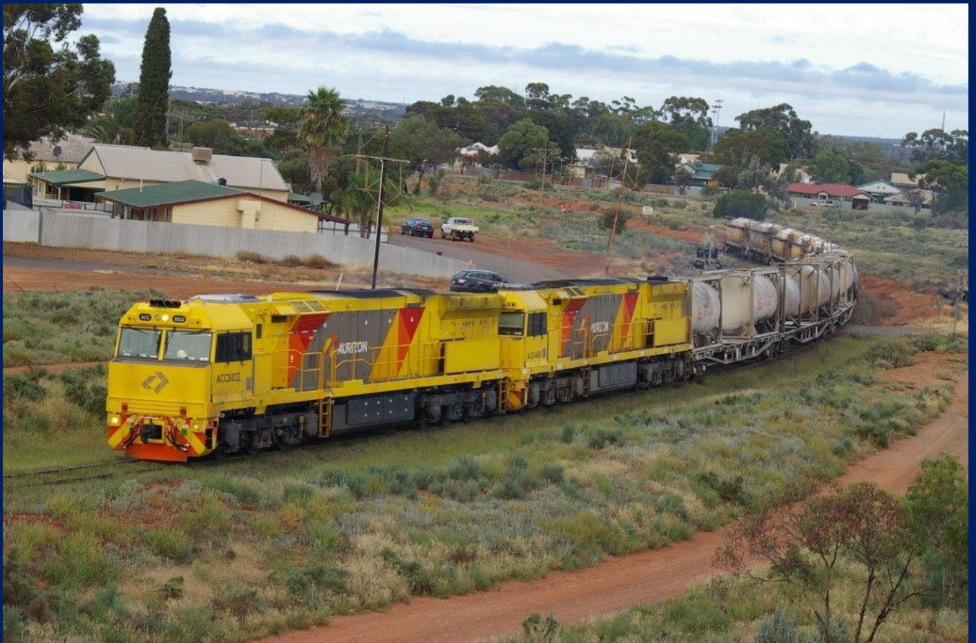
ACC6032 & ACB4406 on 7C71 Parkeston shunter departing Kalgoorlie May 4th.