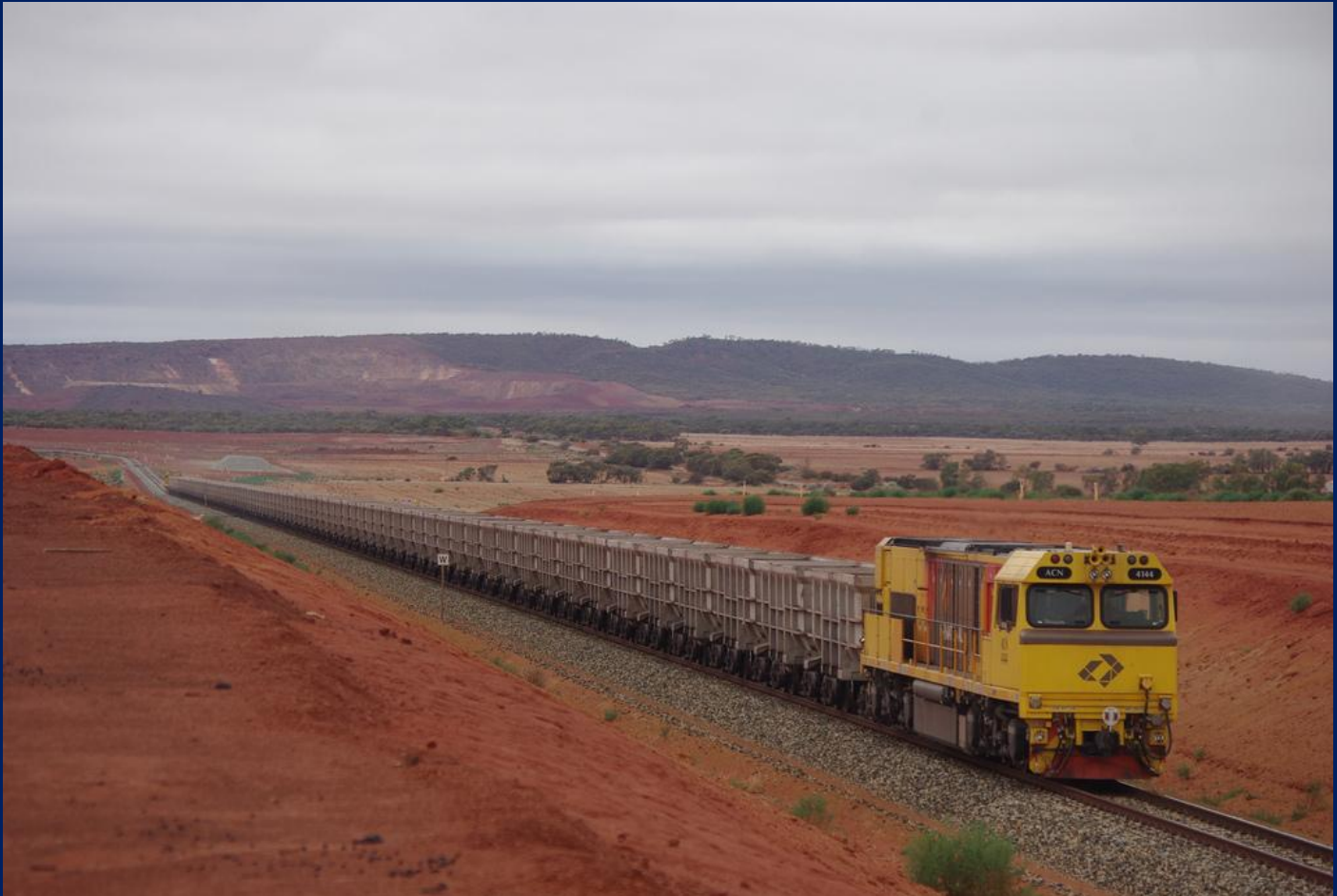
ACN4144 DPU on 5760 empty Karara ore at Kadji Kadji, on way to the mine 2/ 5.