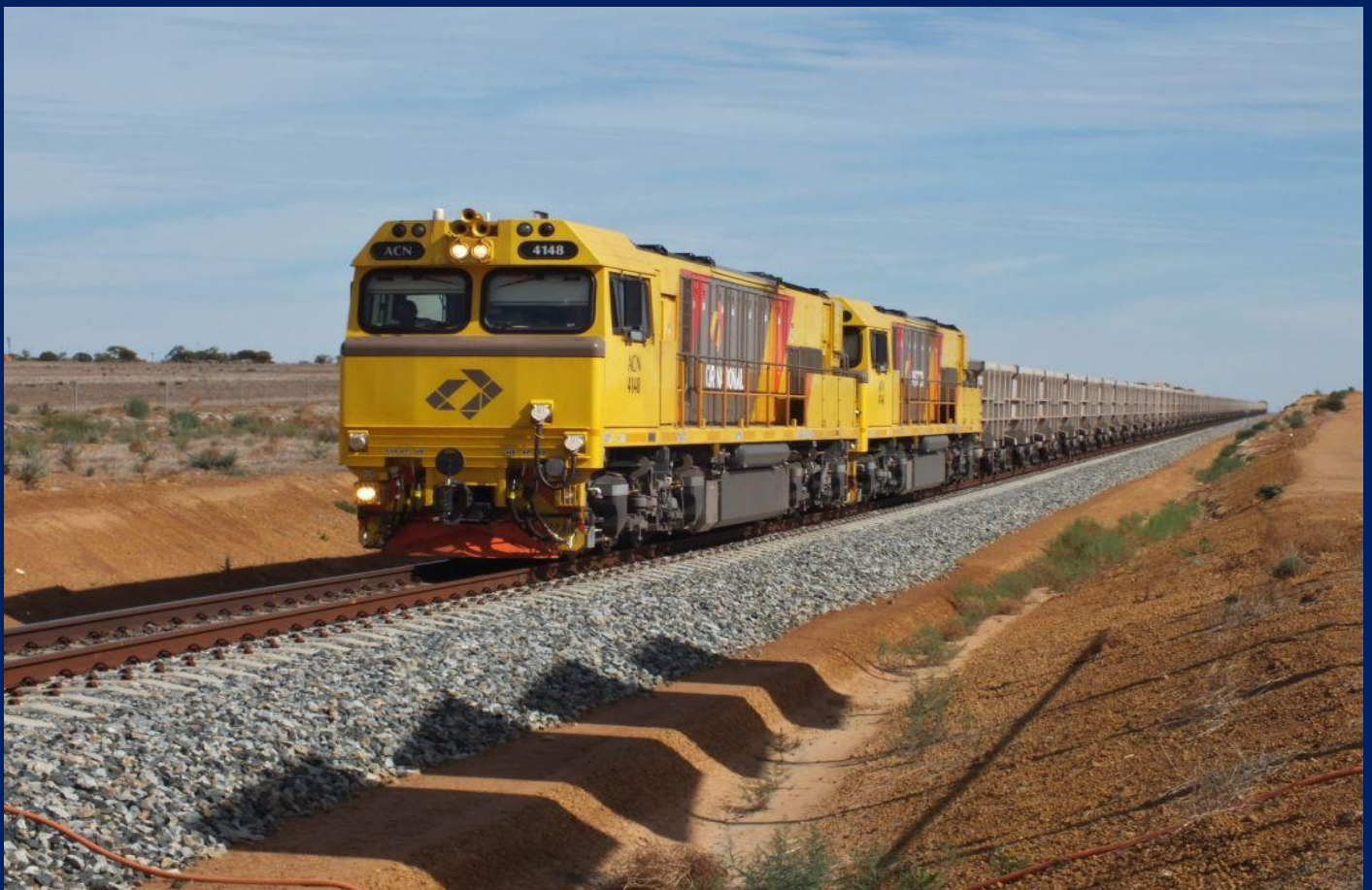
ACN4148 & ACN4146 dpu ACN4151 on empty Karara ore at Morawa May 6th.