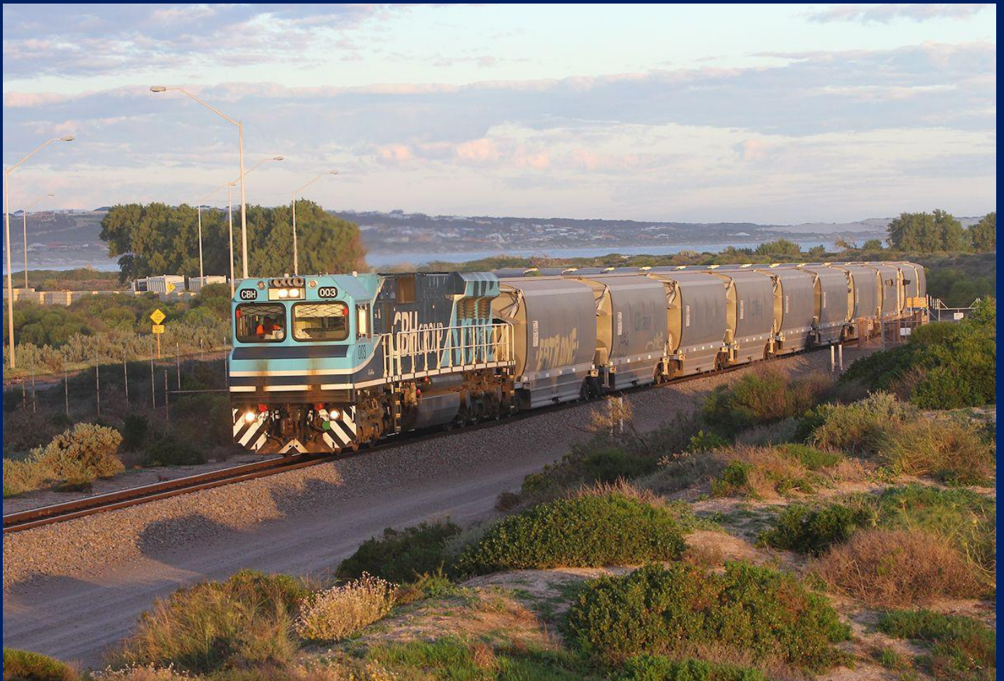
CBH003 on Watco grain Separation Point Geraldton May 26th.