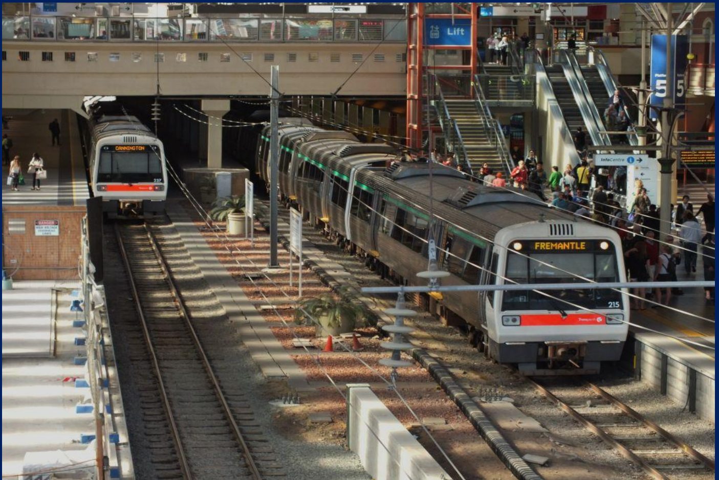
Fremantle train on Platform 5 Cannington on 6 at Perth City Station May 12th.