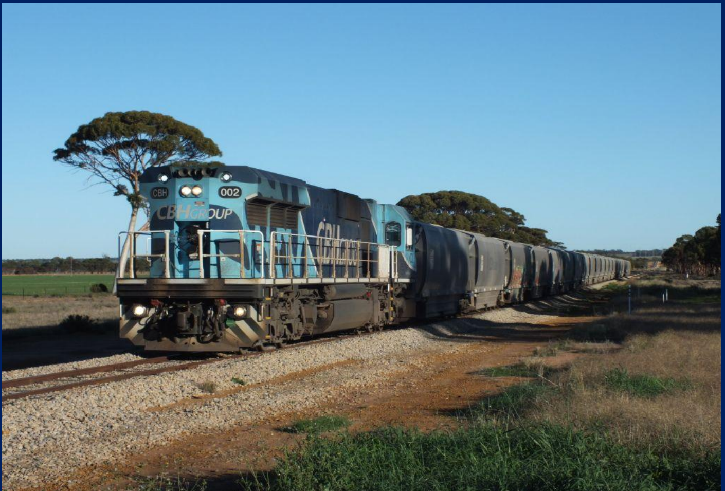
CBH002 on 6M52 empty Watco grain West Merredin Narembeen at Collgar May 24th.