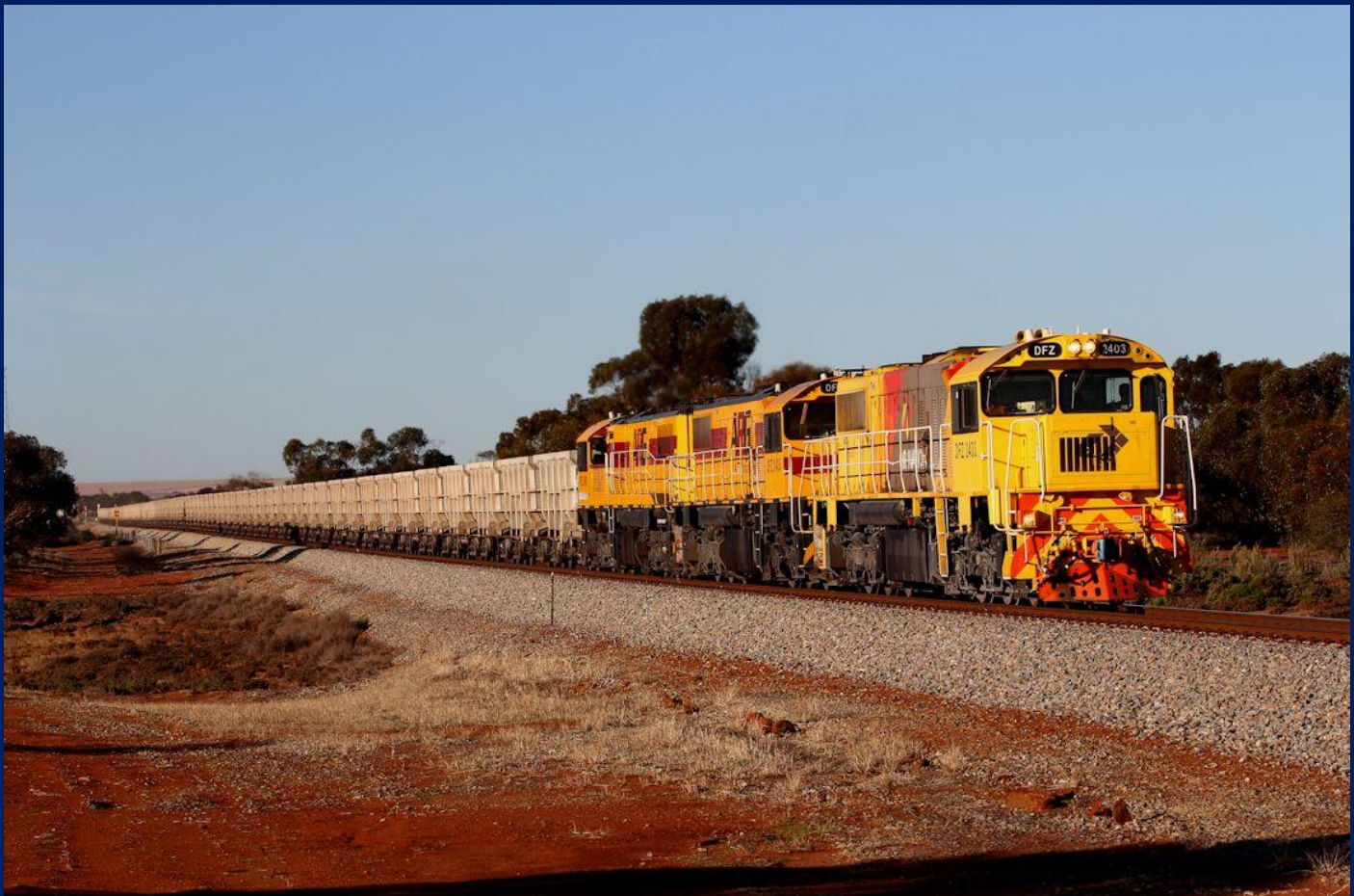
DFZ2403, DFZ2405 & DFZ2401 on Karara Perenjori ore train at Tenindewa May 12th.