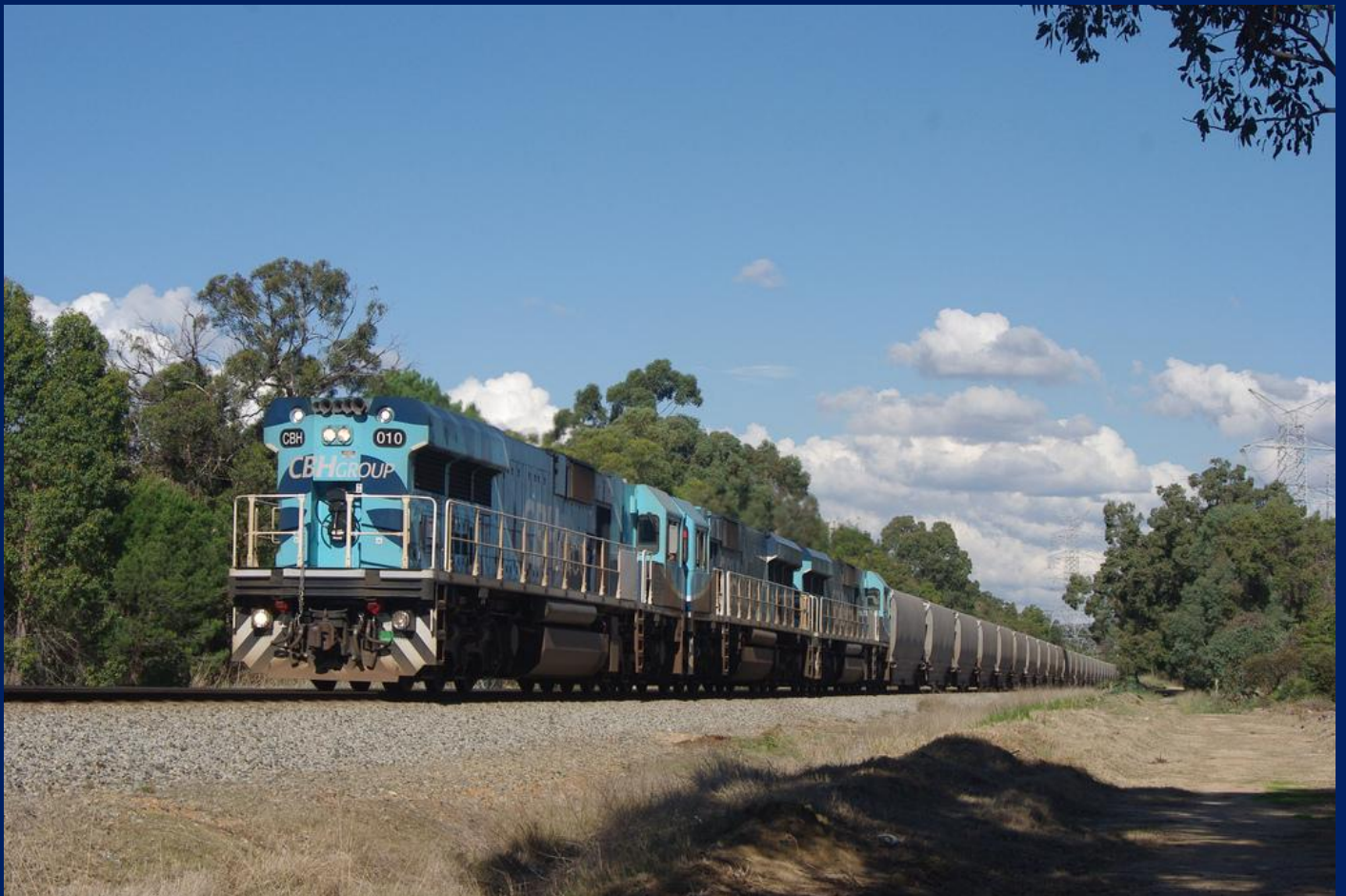
CBH010, CBH006 & CBH001 on K05 empty Watco grain at Middle Swan May 19th.