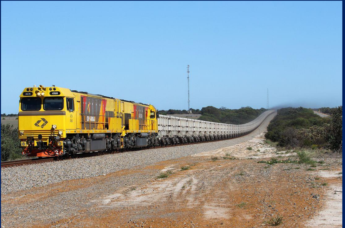
ACN4168 & ACN4142 on empty Karara ore at Kojarena May 12th.