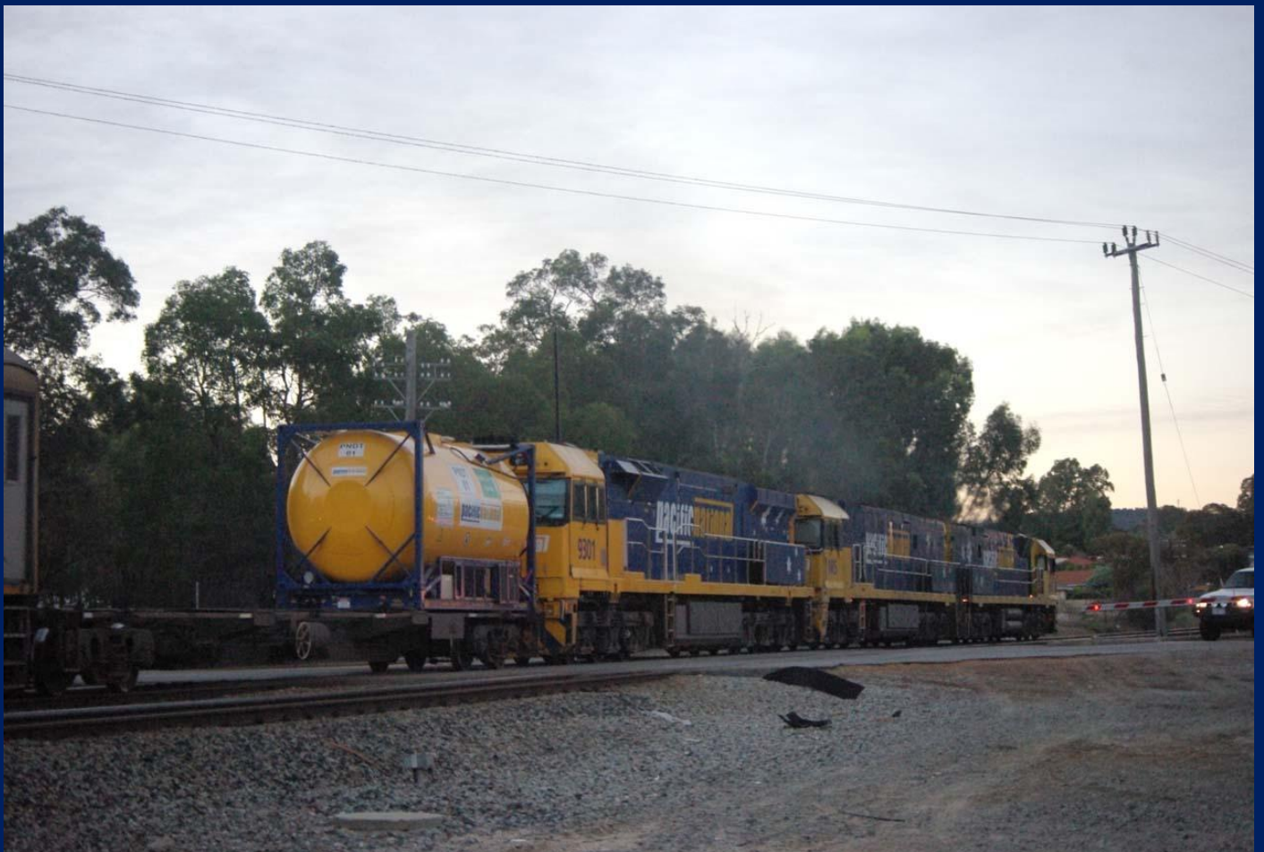
NR77, NR5 & 9301 with inline fuel tanker on 7MP1 at Stratton May 14th.