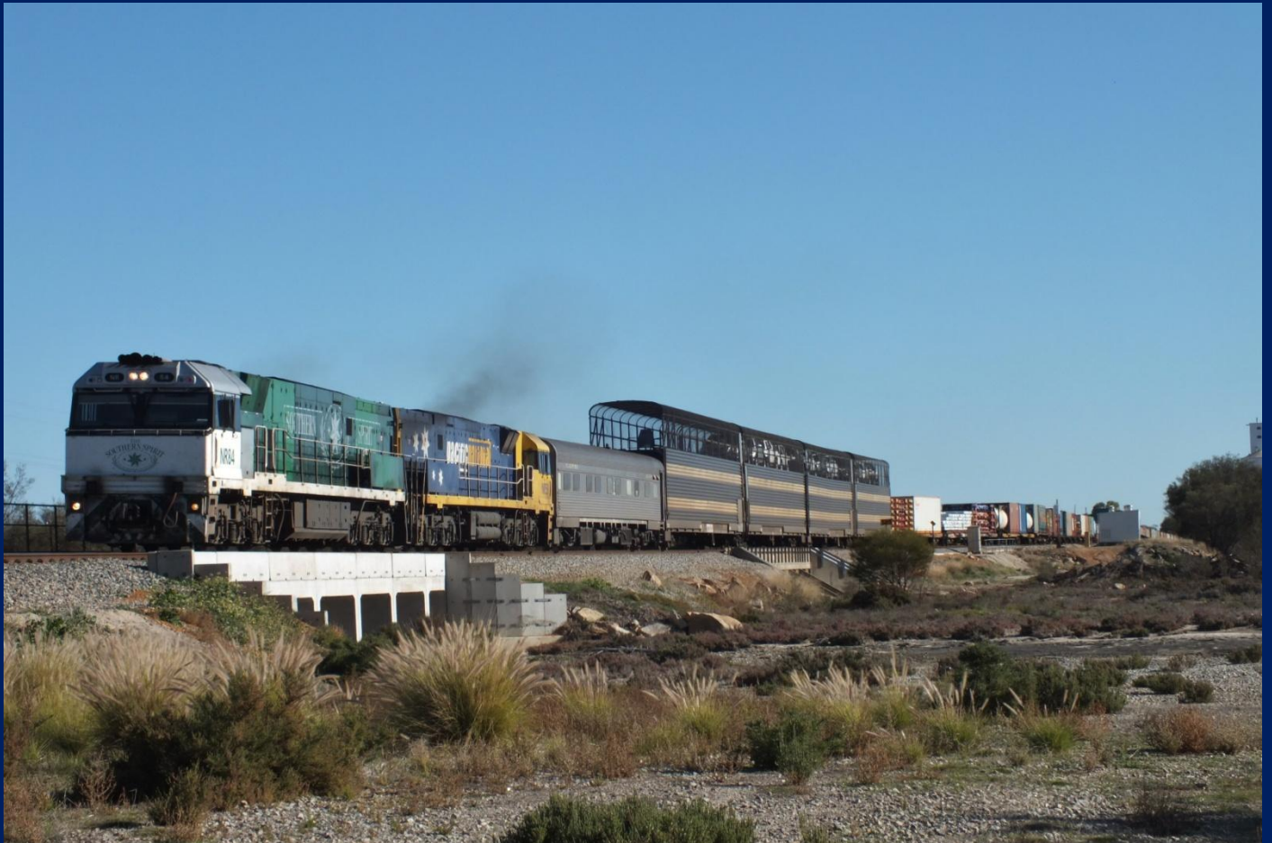
NR84 & NR59 on 6PM5 departing crossing loop Meckering May 24th.