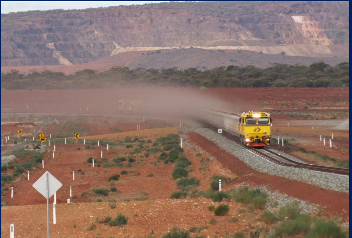
ACN4148, ACN4146 dpu ACN4151 with old WMC mine in distance 06/05.