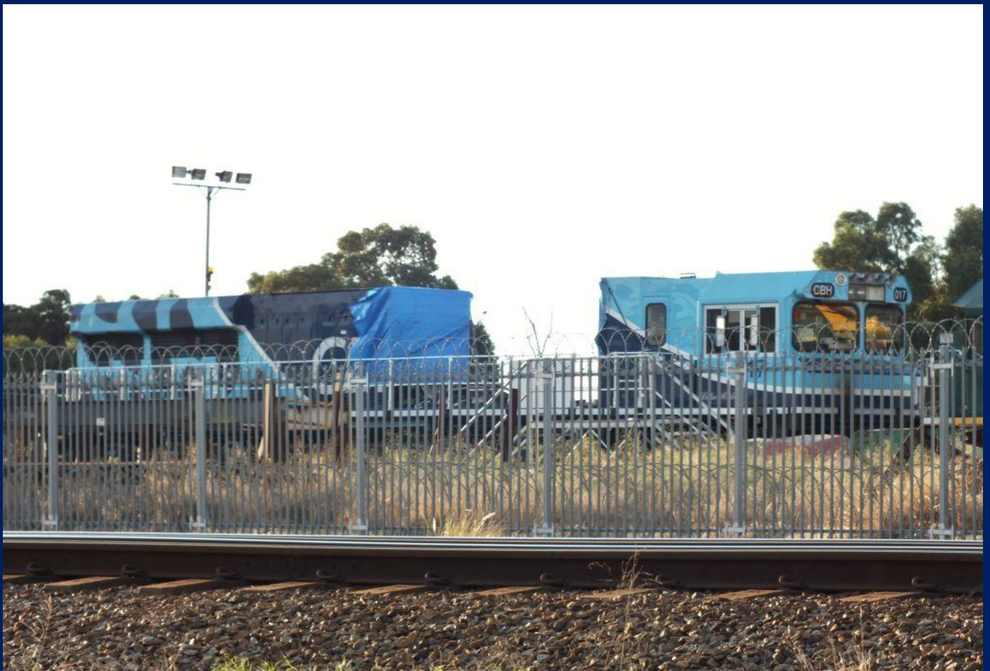
CBH017 with no engine in SSRS/Gemco yard Bellevue 04/05 where it was removed.