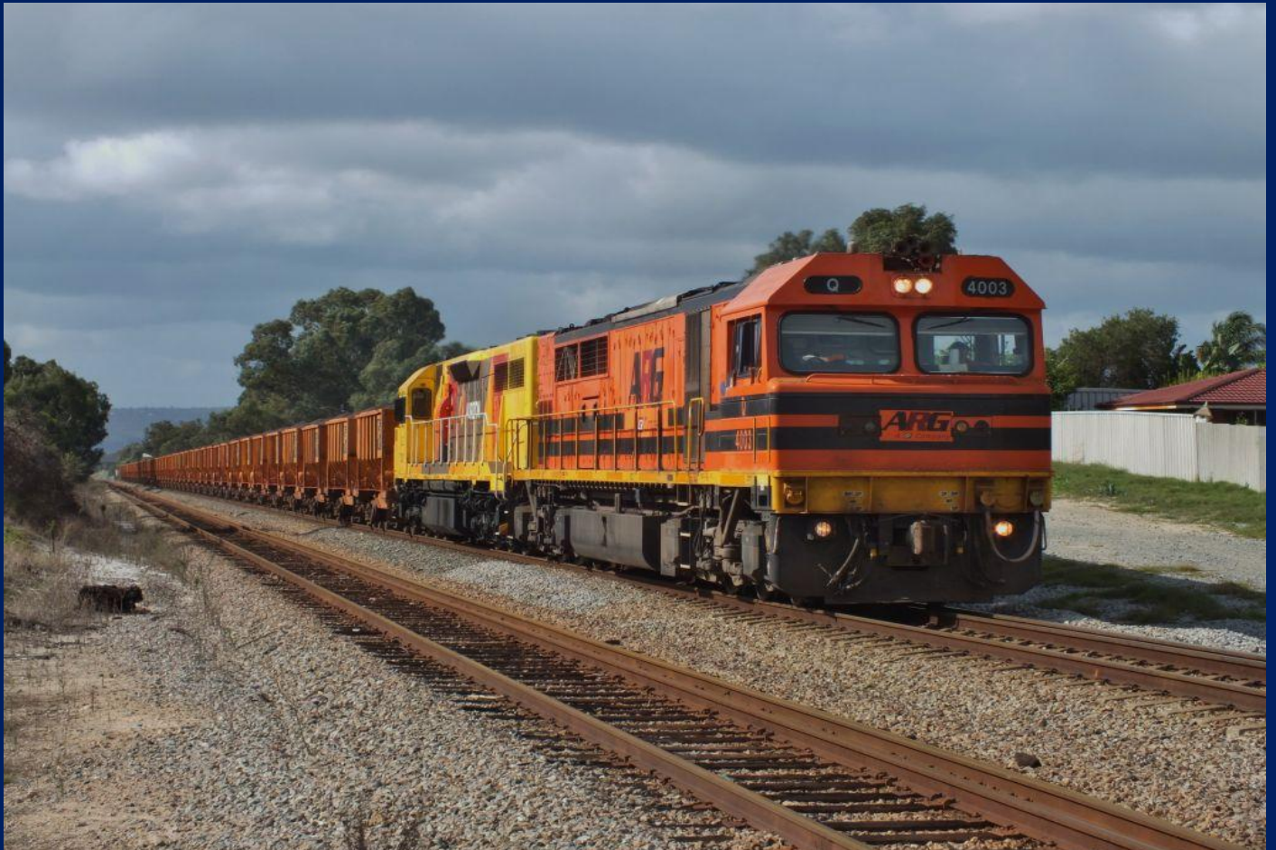
Q4003 & LZ3103 on 5032 ore to Kwinana at Thornlie May 24th.