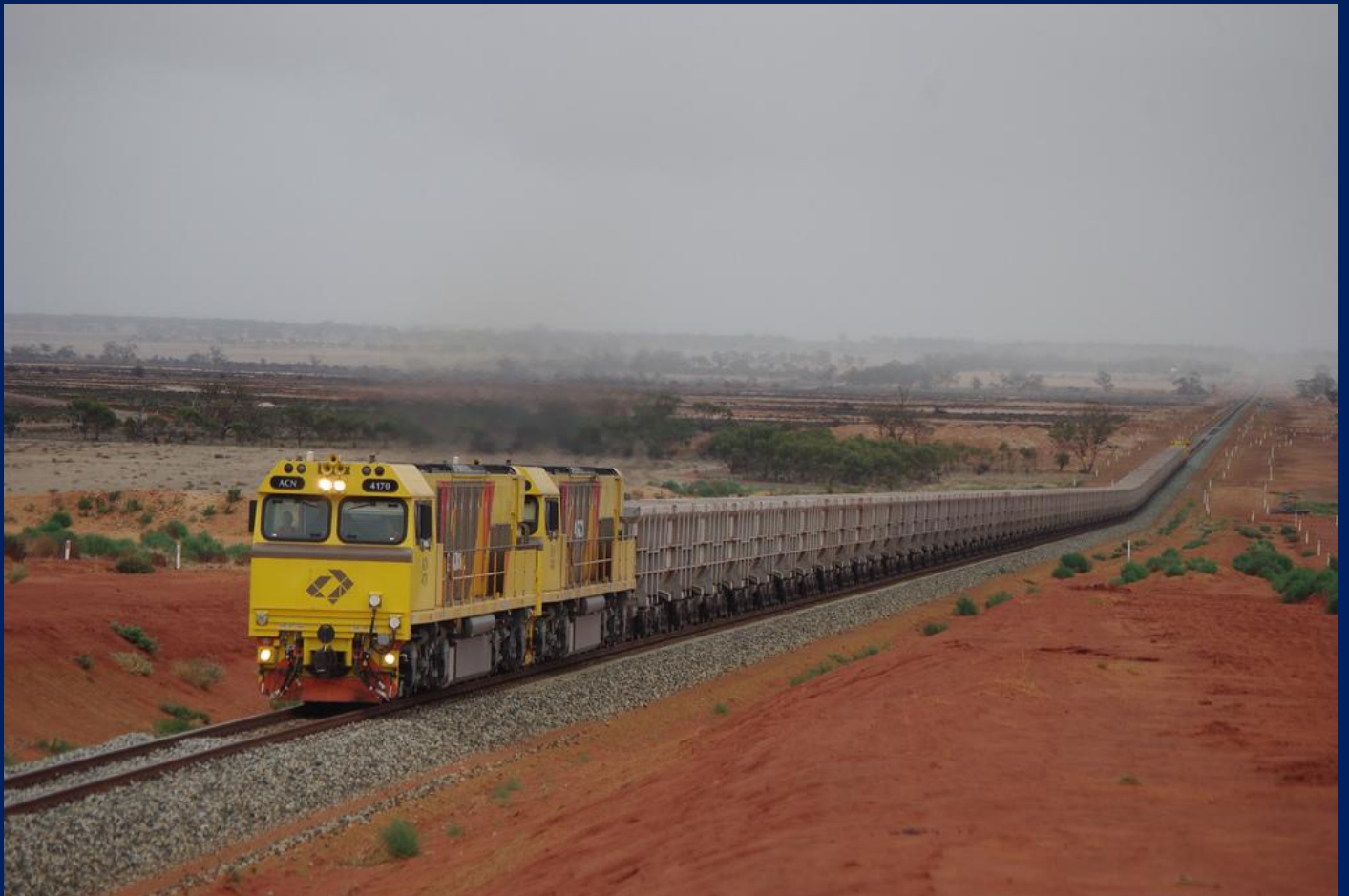
ACN4170 & ACN4145 DPU ACN4170 on empty Karara ore to mine Kadji Kadji May 2nd.