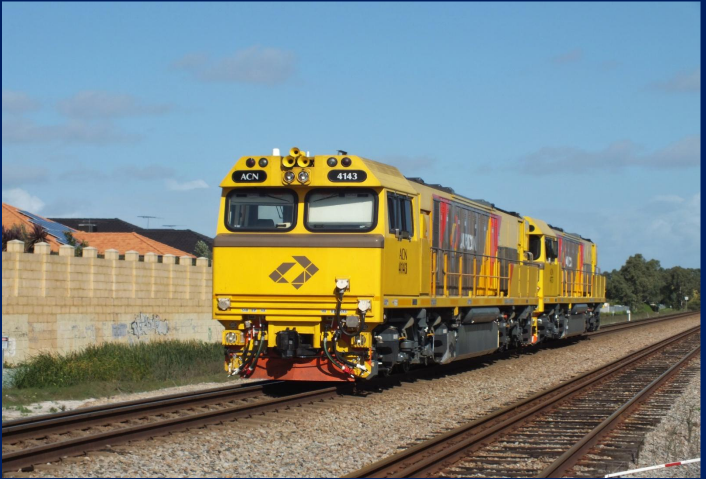
ACN4143 & ACN4175 on 5120 light engine at Thornlie May 24th.