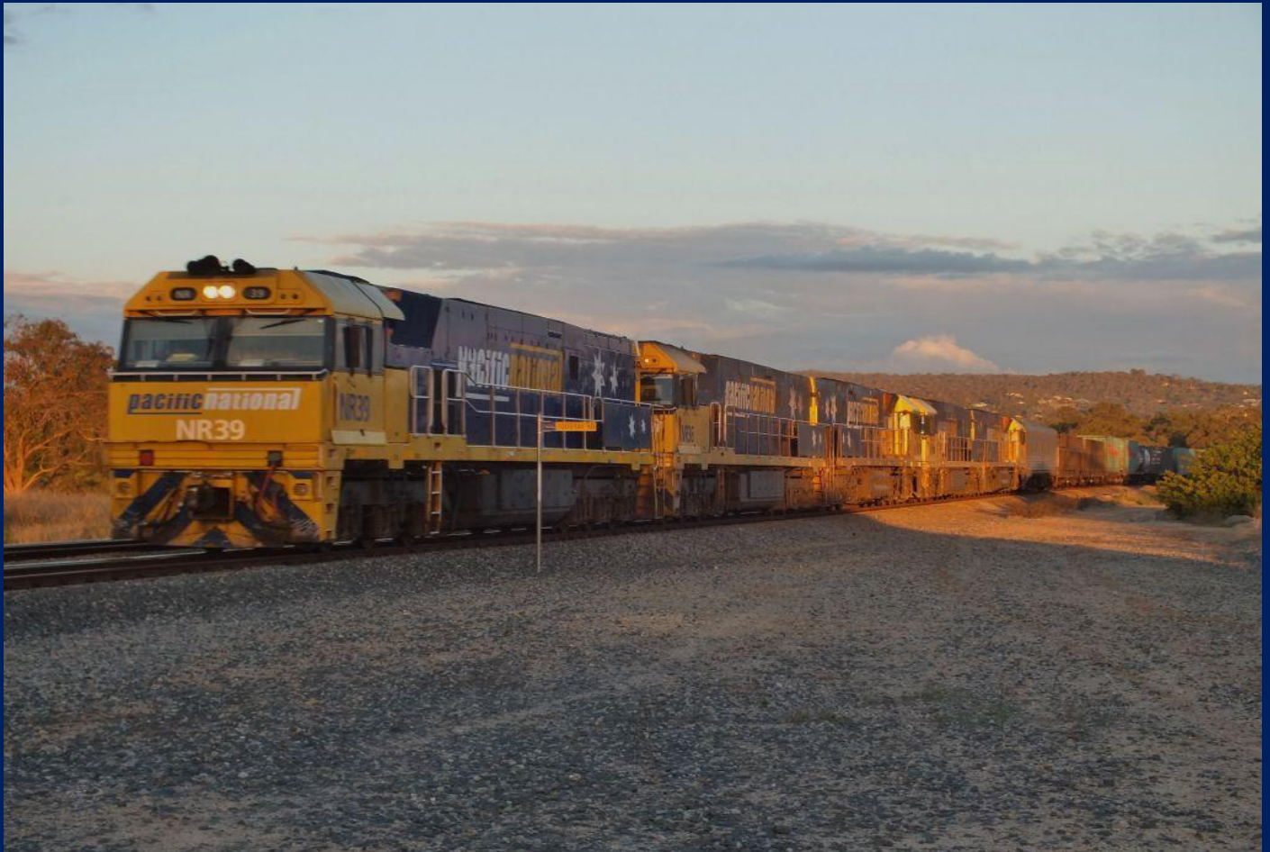
NR39, NR36, NR37, NR108 & NR97 on 1PM5 intermodal at Stratton May 26th.