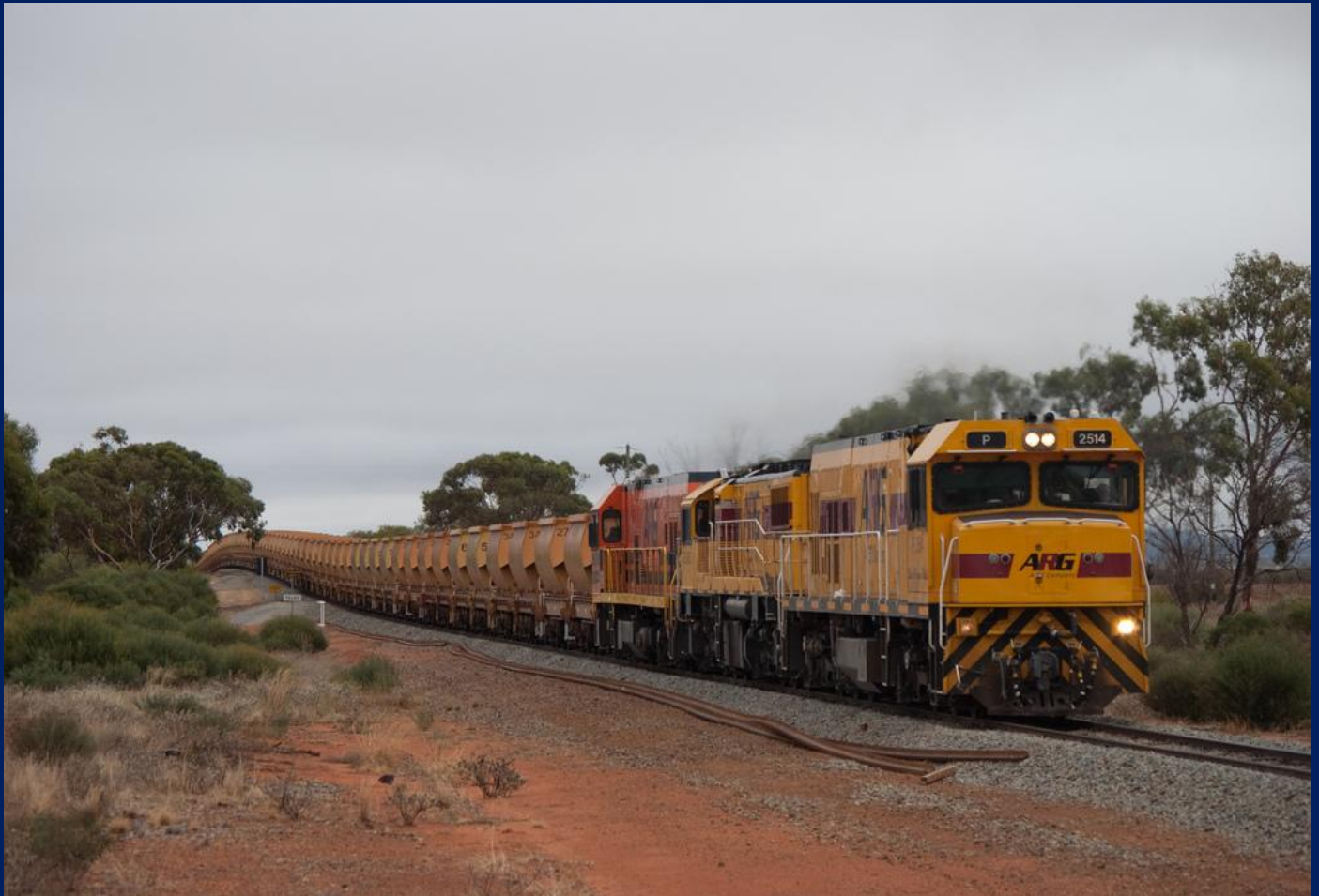
P2514, DFZ2405 & P2503 on Mt Gibson Perenjori ore at Tilley May 2nd.