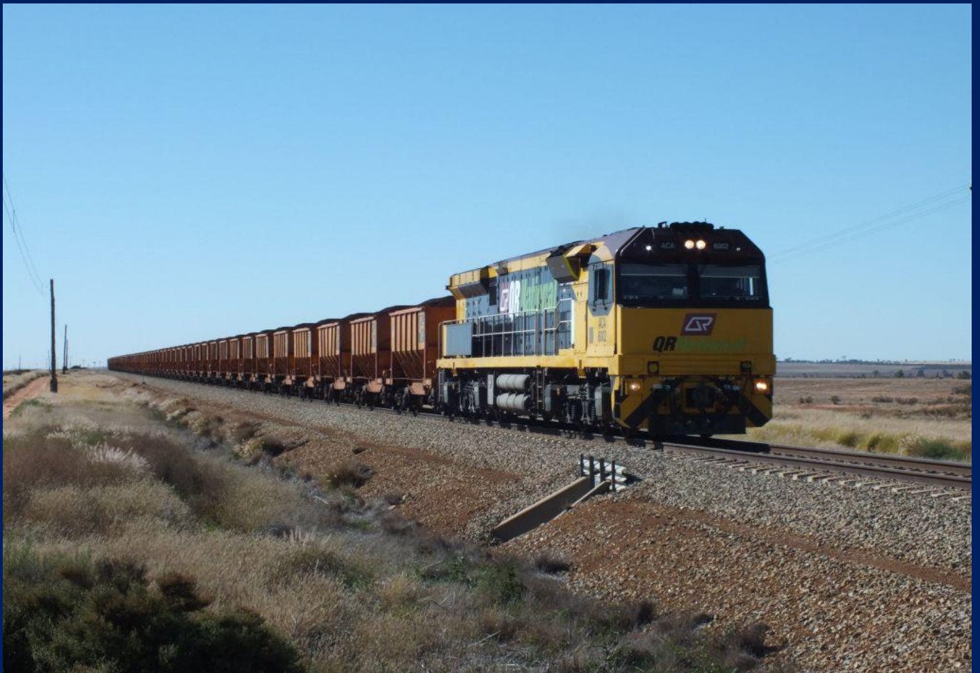
ACA6002 on 6032 ore train approaching Doodlakine May 24th.