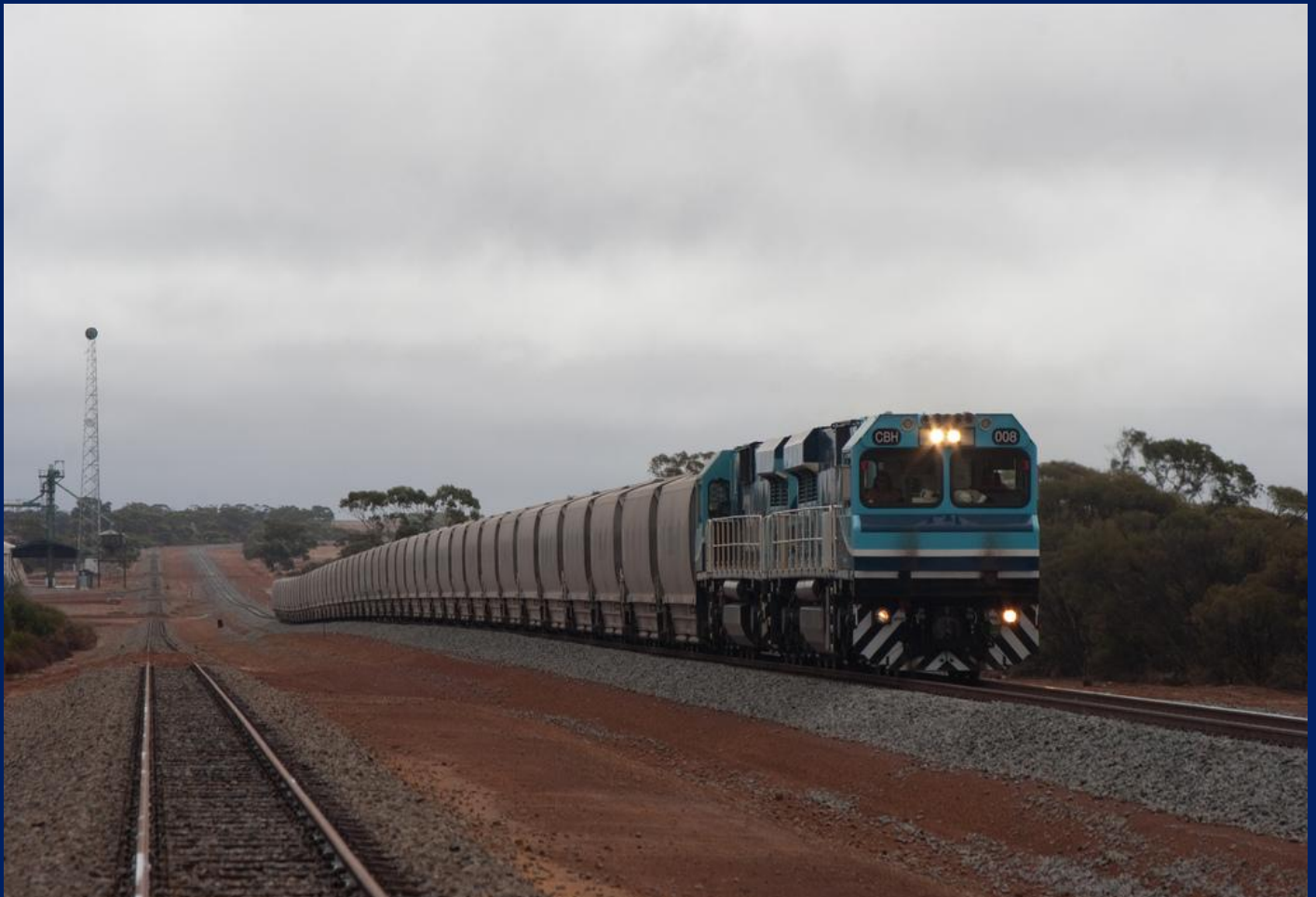
CBH008 & CBH007 on 5G50 Watco grain climbing grade out of Pintharuka May 2nd.