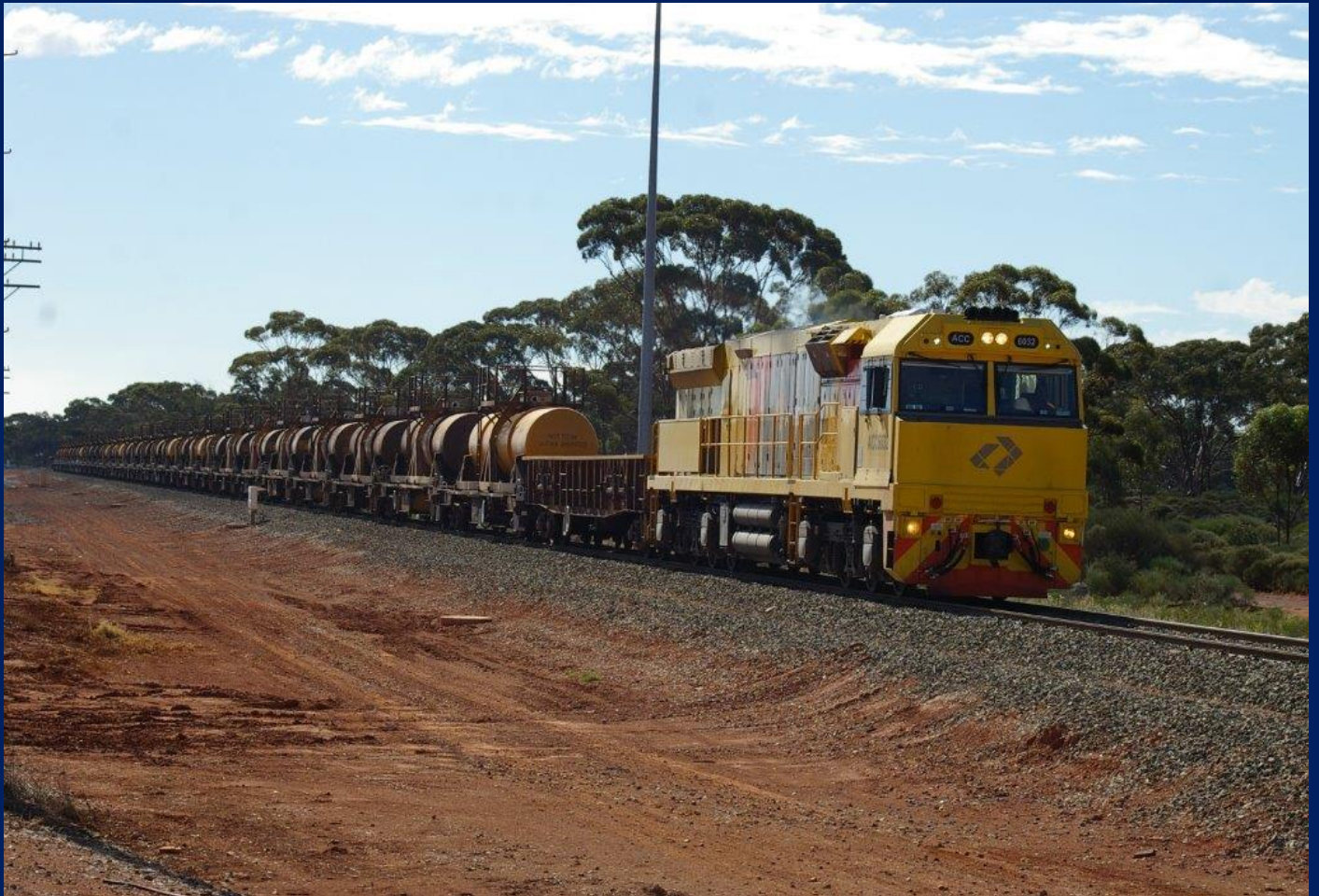
ACC6032 on 7405 empty acid tankers to Hampton at Binduli May 4th.