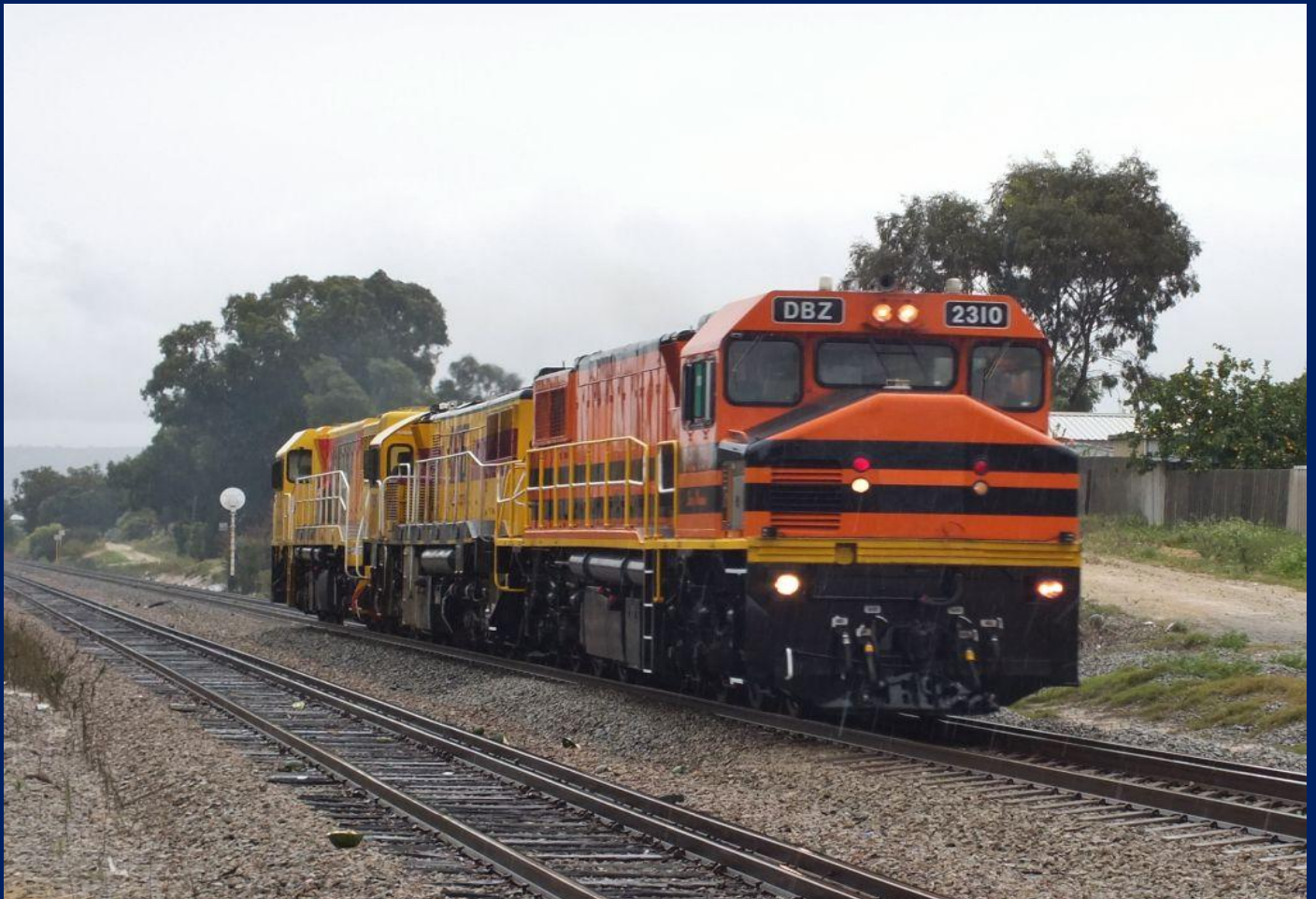
DBZ2310, DD2357 & DBZ2311 on 5124 light engine [DBZ2310 return to service] Thornlie 30/5.