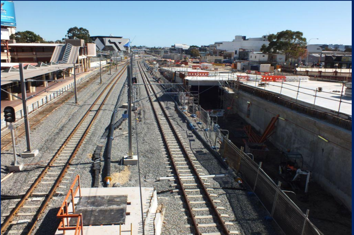
Fremantle line tunnel under construction with Fremantle line and platform 11 on 12/05.