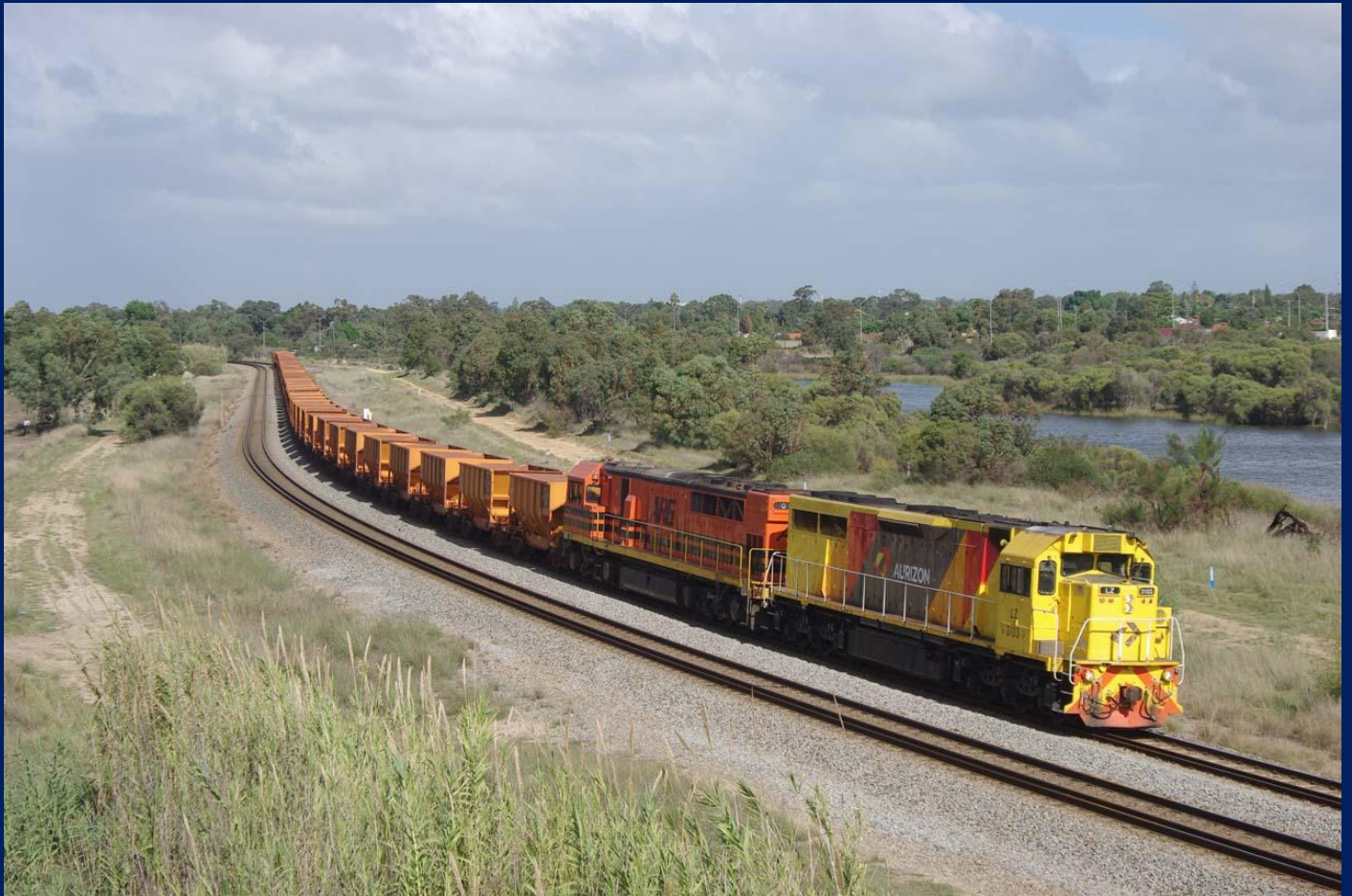
LZ3106 & Q4003 on 4035 empty ore ex Kwinana at Welshpool May 8th.