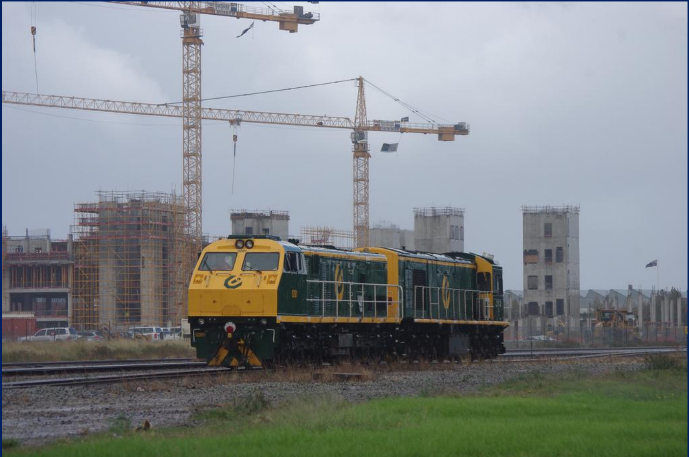
U201 & R1902 on 3QB4 light engines departing flashbutt siding Midland 8/5.