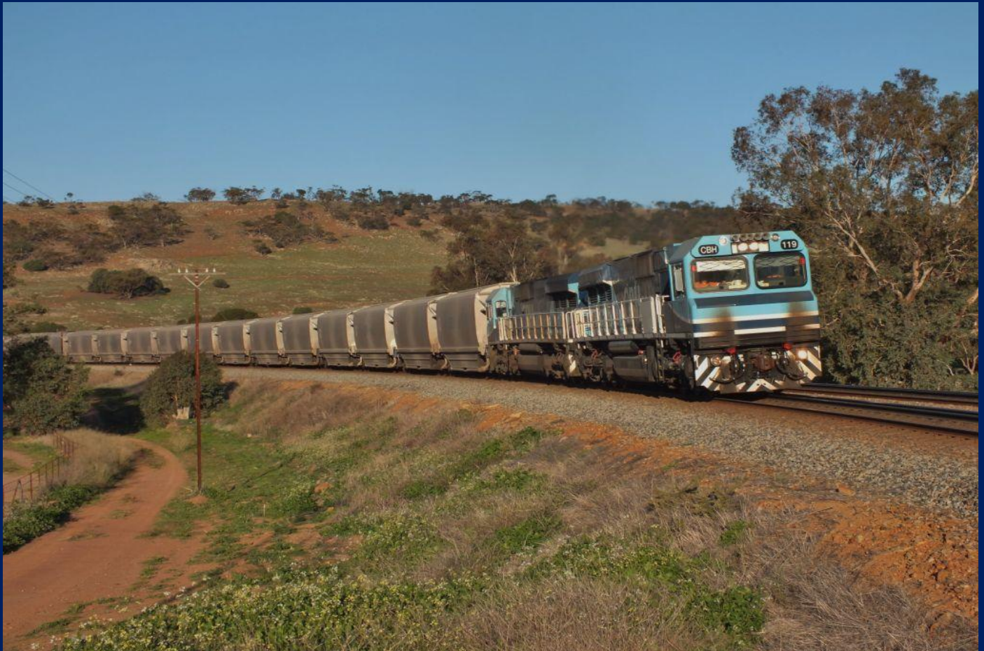
CBH119 & CBH121 on 6S56 Watco grain wrong line running just west of Avon Yard 24/05.