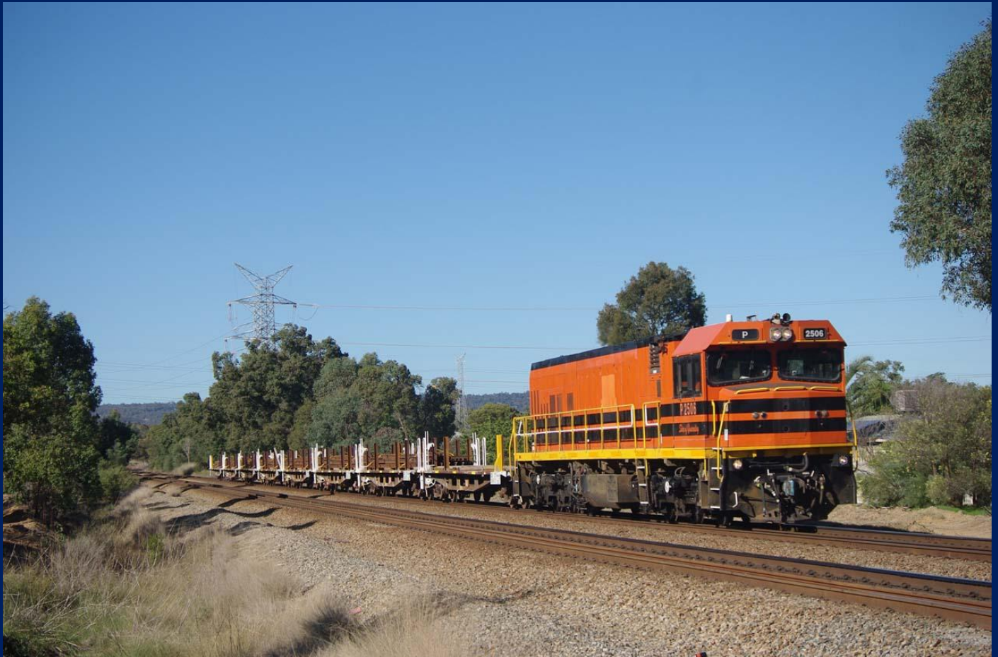
P2506 on 4RT1 rail train at Swan View on May 15th.