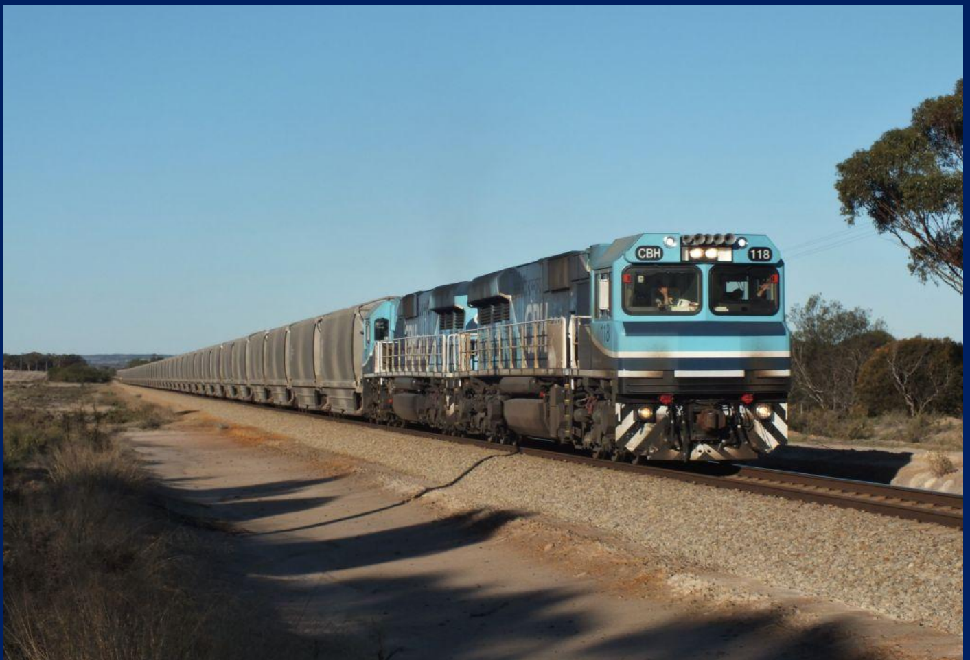
CBH118 & CBH122 on 6S58 Watco grain at Meenaar May 24th.