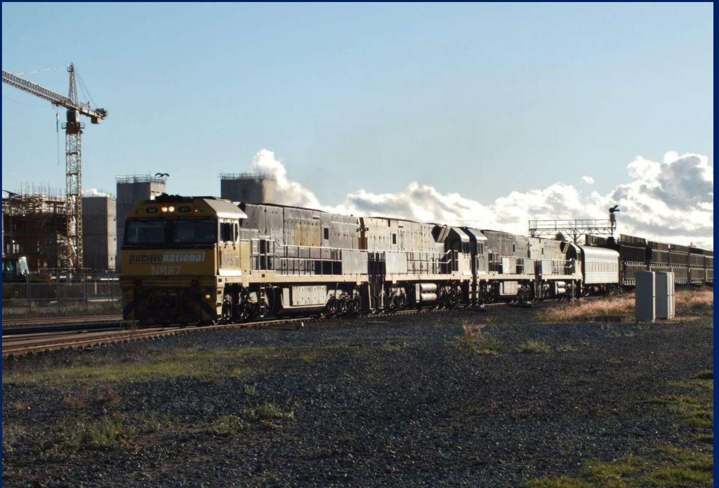
NR87, NR41, NR27 & NR114 on 1PM5 at Midland with new hospital under construction 19/05.