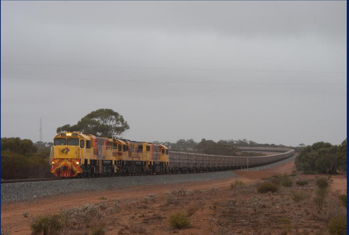
DFZ2402, DFZ2401 & DFZ2403 on 4763 Karara ore loaded at Mt Gibson Perenjori, Tardun May 2nd.