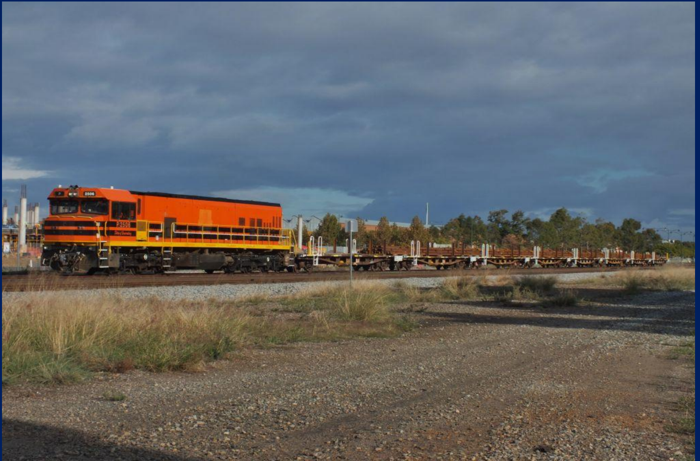
P2506 on 2RT3 rail train in loop Midland waiting for a path up Avon Valley May 20th.