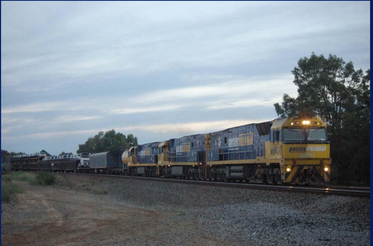
NR77, NR5 & 9301 [for crew training Kewdale] on 7MP5 intermodal at Stratton 14/05.