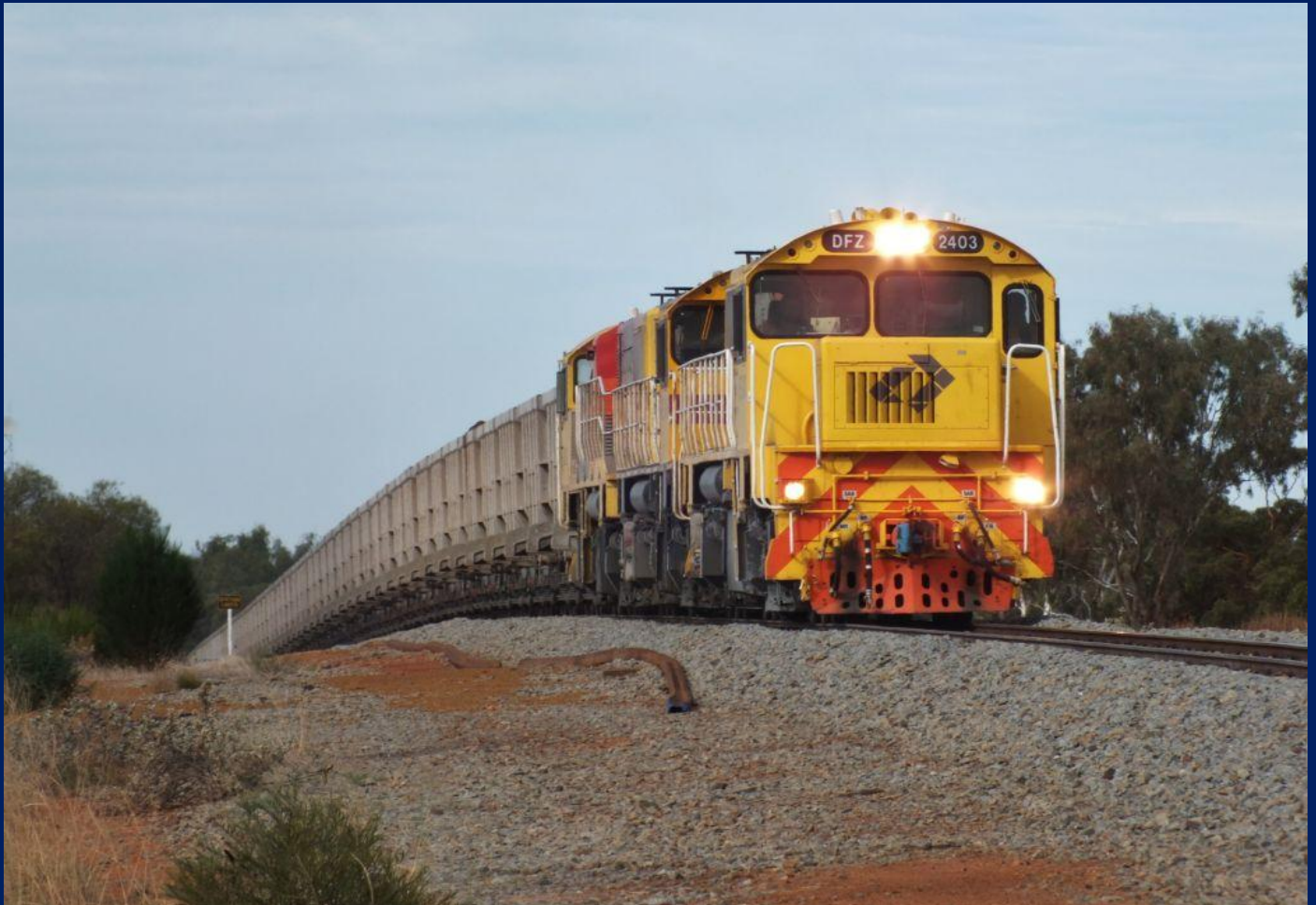
DFZ2403, DFZ2405 & DFZ2402 on Karara ore from Perenjori climbing grade out of Morawa 07/05.