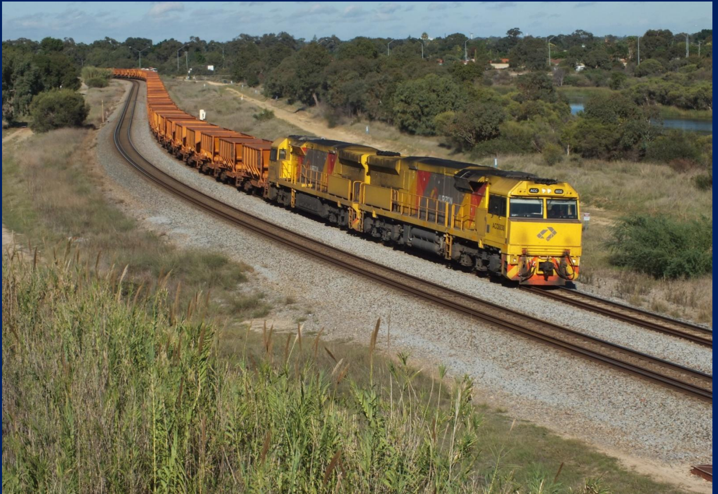
ACC6030 & ACC6031 on 6031 empty ore ex Kwinana at Welshpool May 3rd.