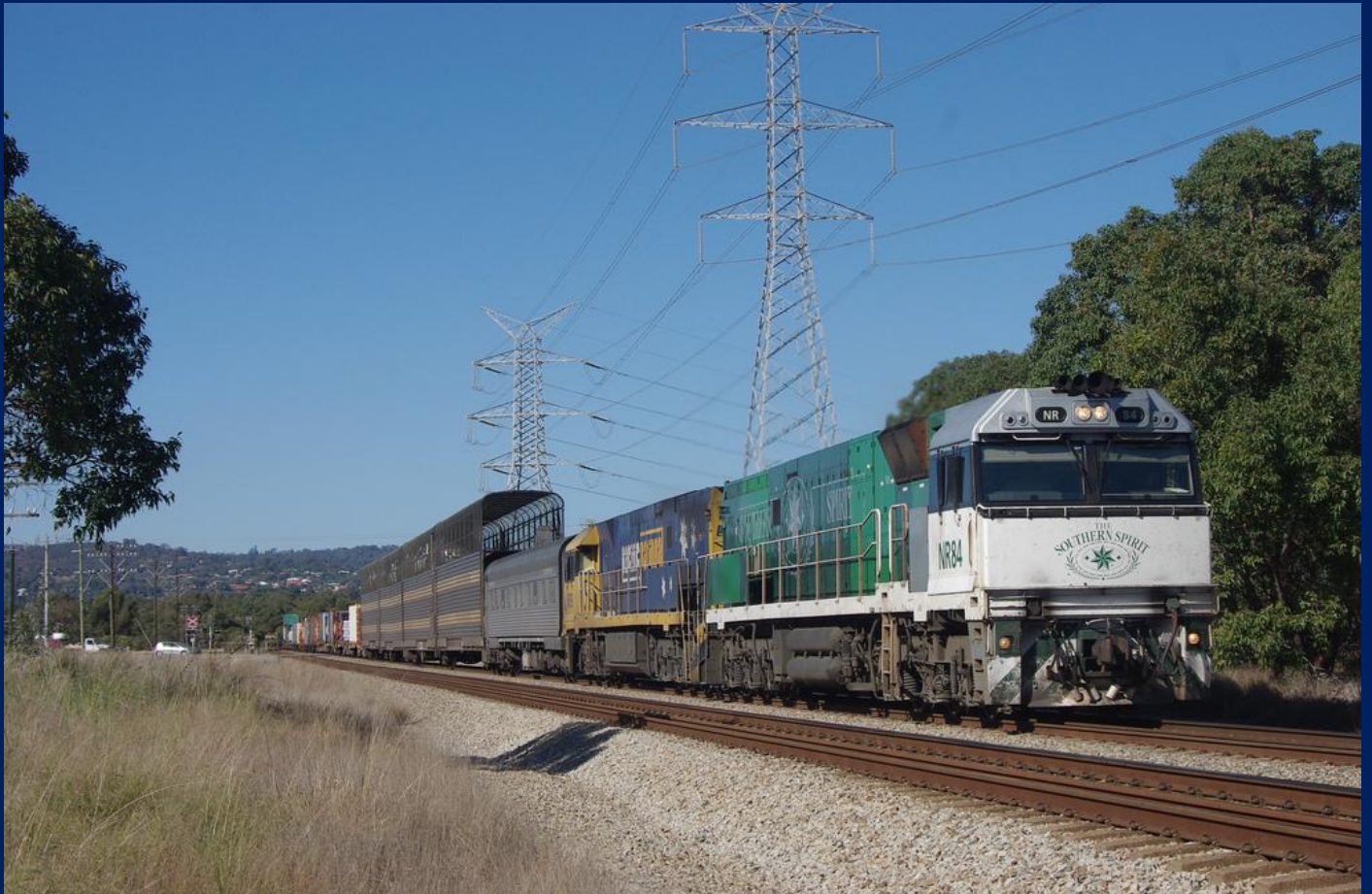
NR84 & NR59 on 6PM5 intermodal Middle Swan May 24th.