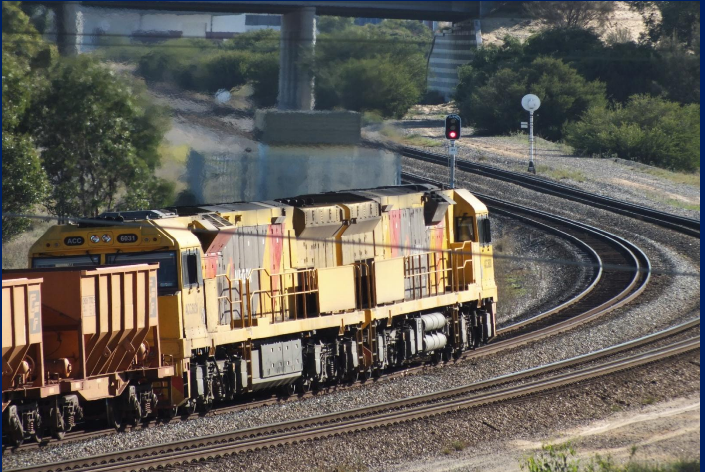
ACC6031 & ACC6032 on 6031 empty ore in full dynamic as prepares to stop Welshpool 03/05.