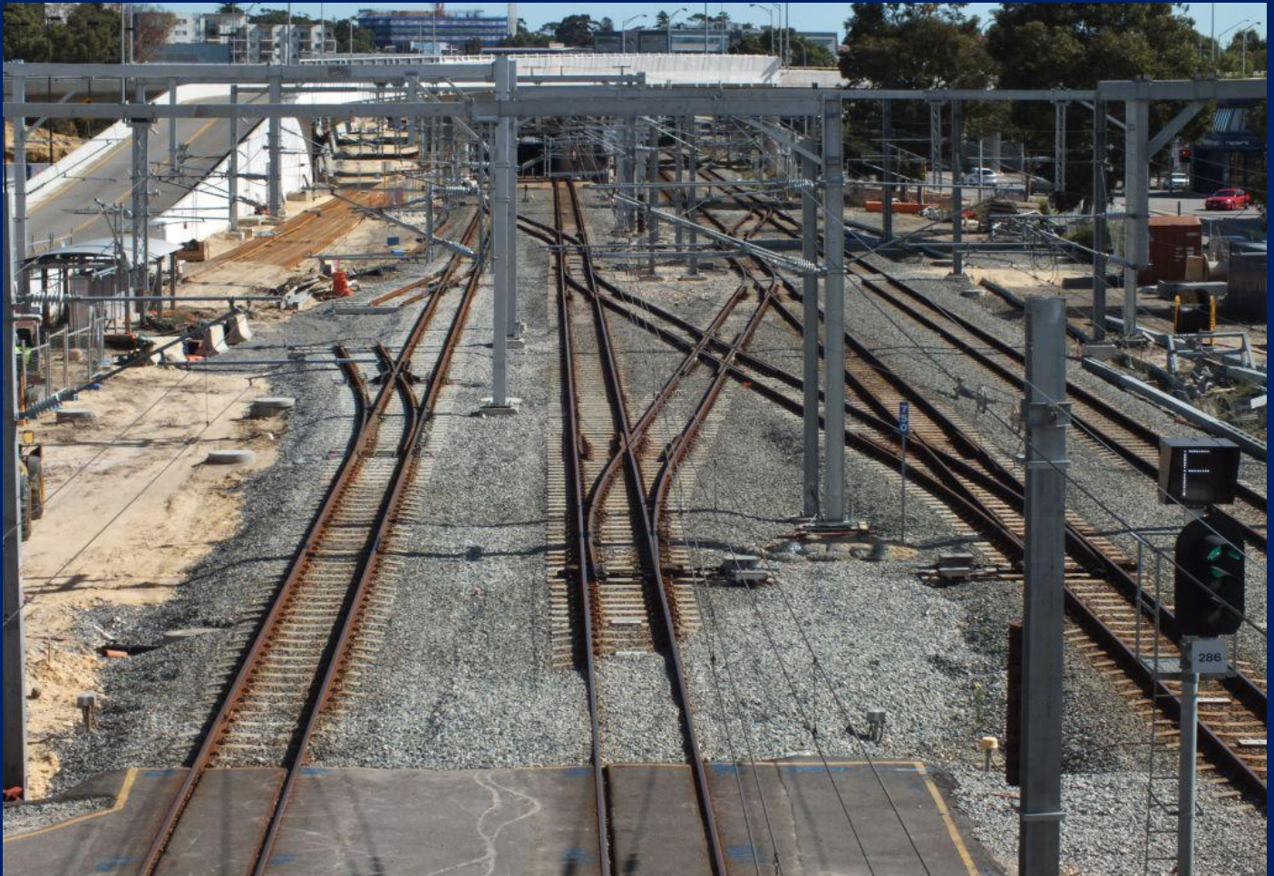
Fremantle lines to right, Clarkson line in centre and new Fremantle line alignment to left 12/05.