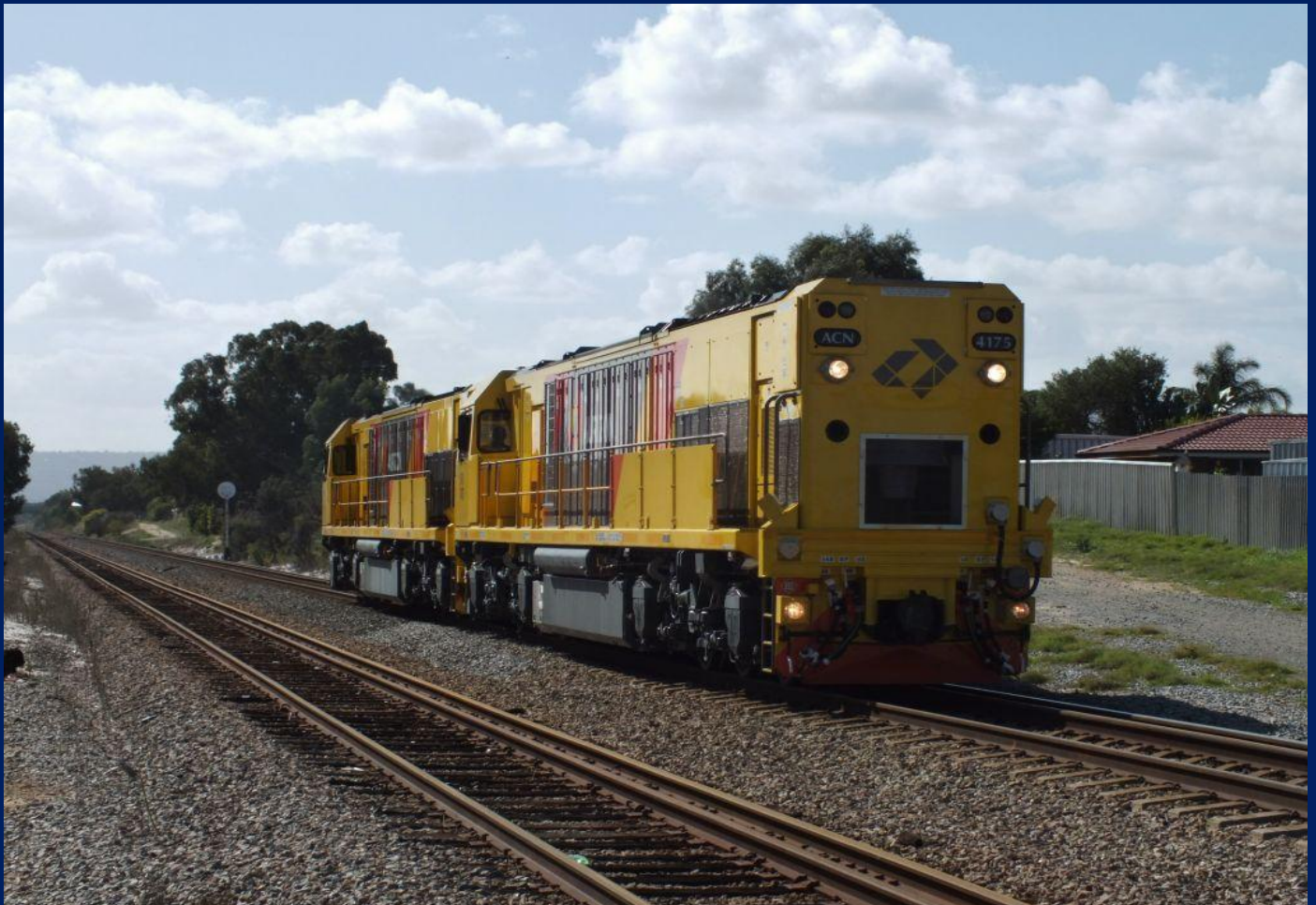
ACN4175 & ACN4143 on 5120 light engine Forrestfield to Kwinana at Thornlie 09/05.