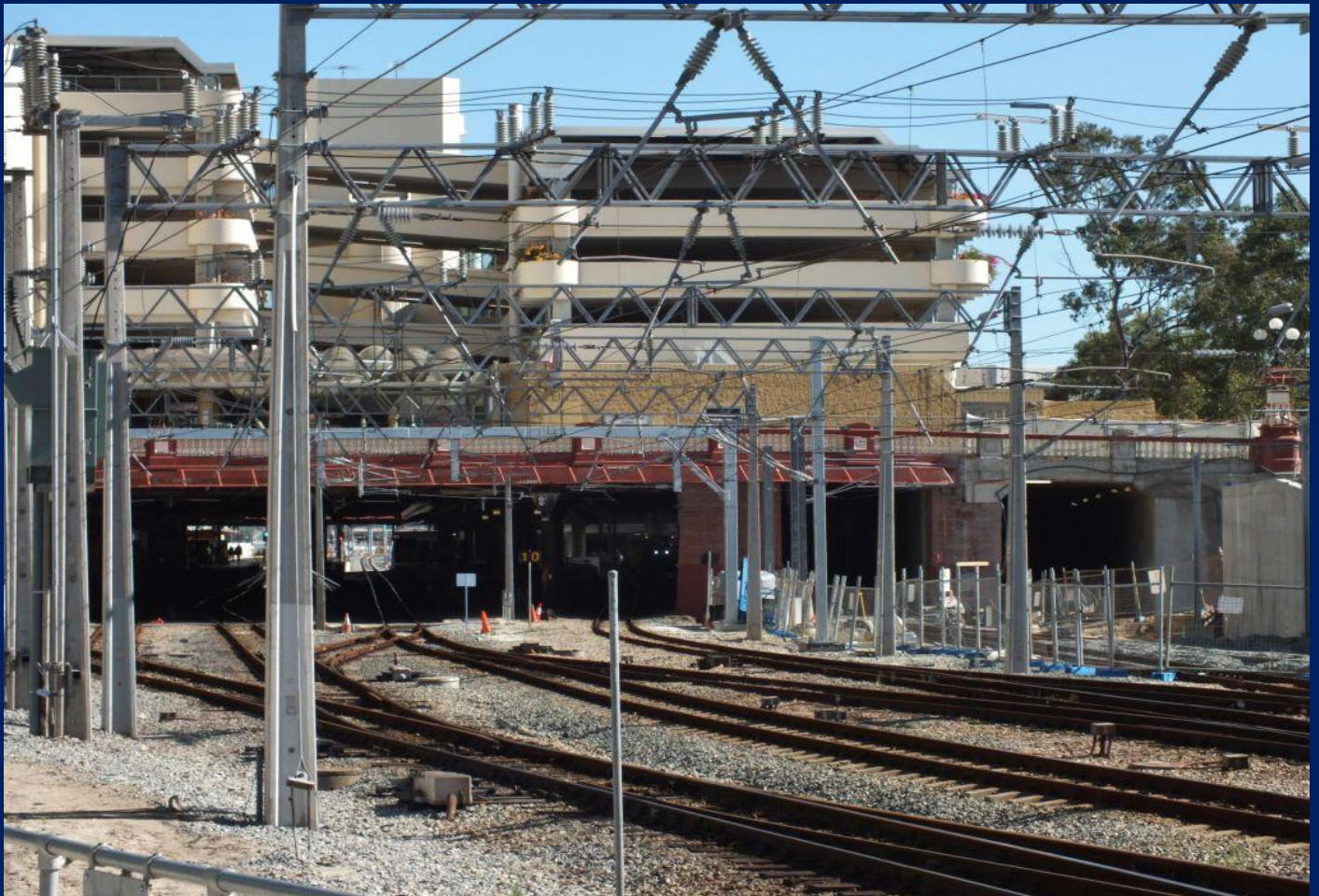
Perth Station with platforms 5 and 6 as through Fremantle line tracks May 12th.