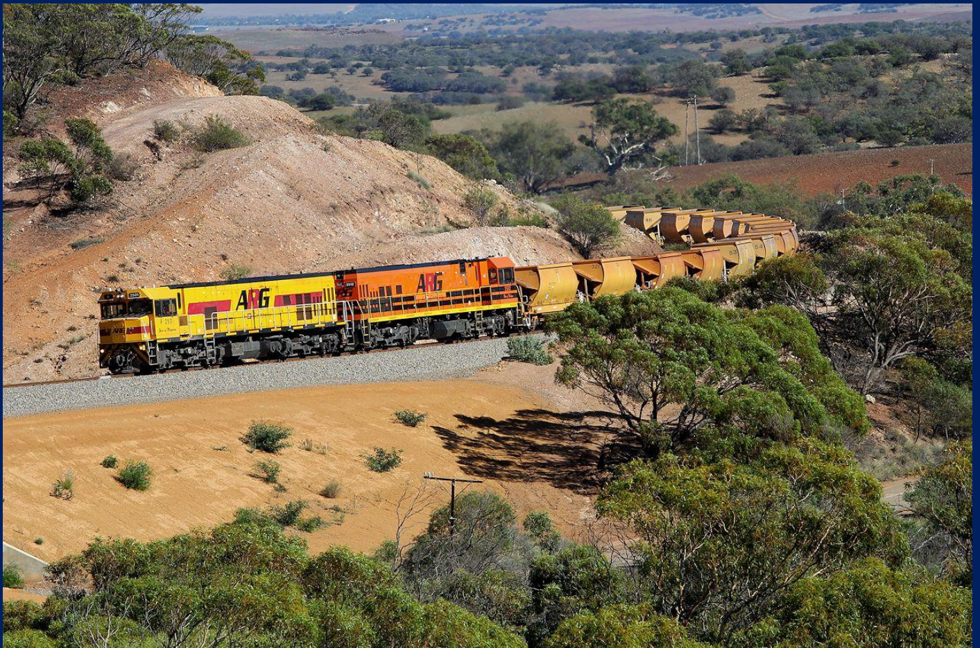
P2501 & 2512 on empty Mt Gibson ore at Bringo May 12th.