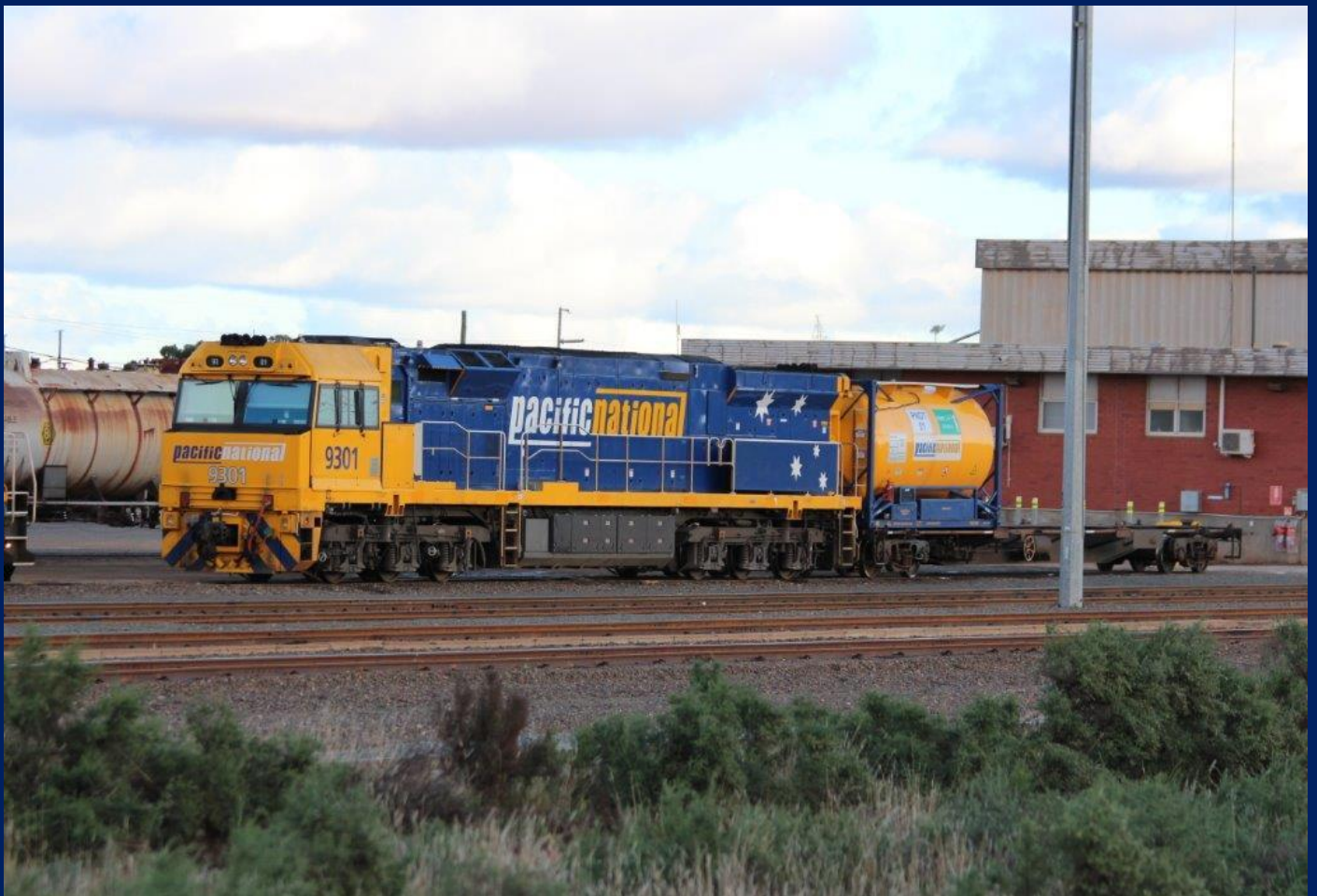
9301 with inline fuel module for crew training in West Kalgoorlie yards June 3rd.