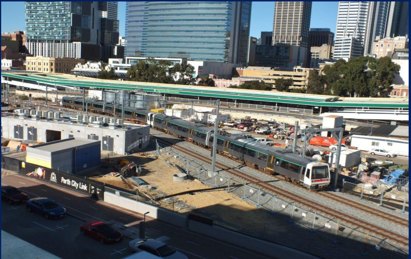
Four car EMU sets on temporary Fremantle line west of Perth Station June 30th.