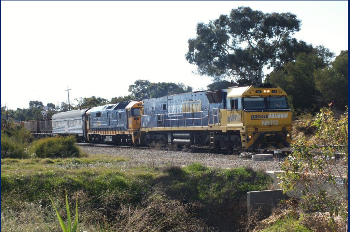
NR113 & 8118 on 4WP2 crossing over to enter Forrestfield Yard June 16th.