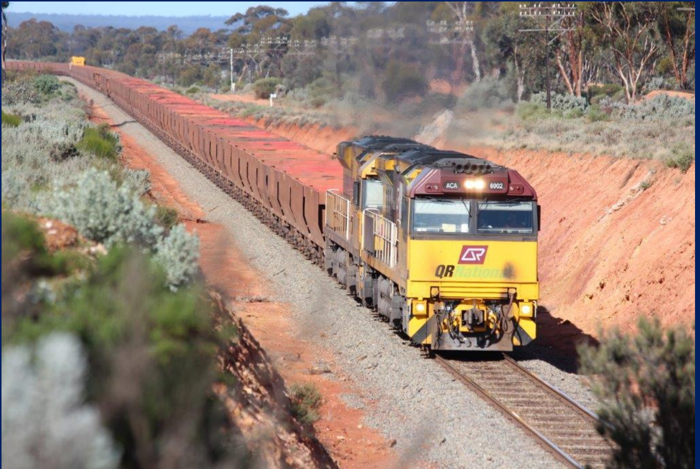
ACA6002 first ACA to Esperance [12/6], AC4305 dpu AC4307 & Q4001 on 1414 empty ore at Binduli 16/6.