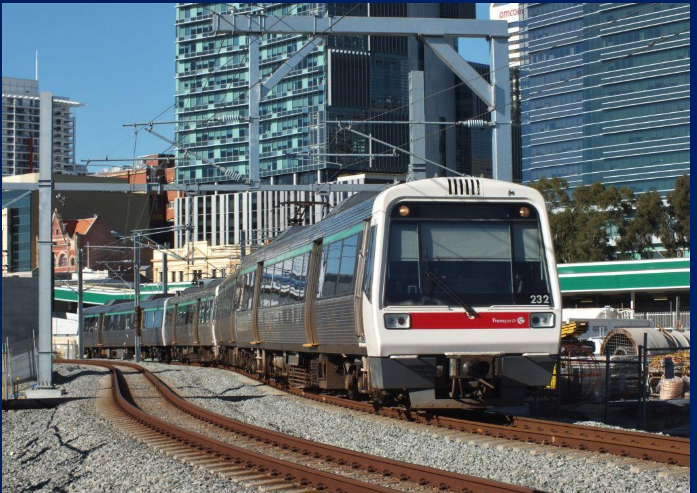
EMU set #32 and further EMU set run on temporary Fremantle line June 30th.