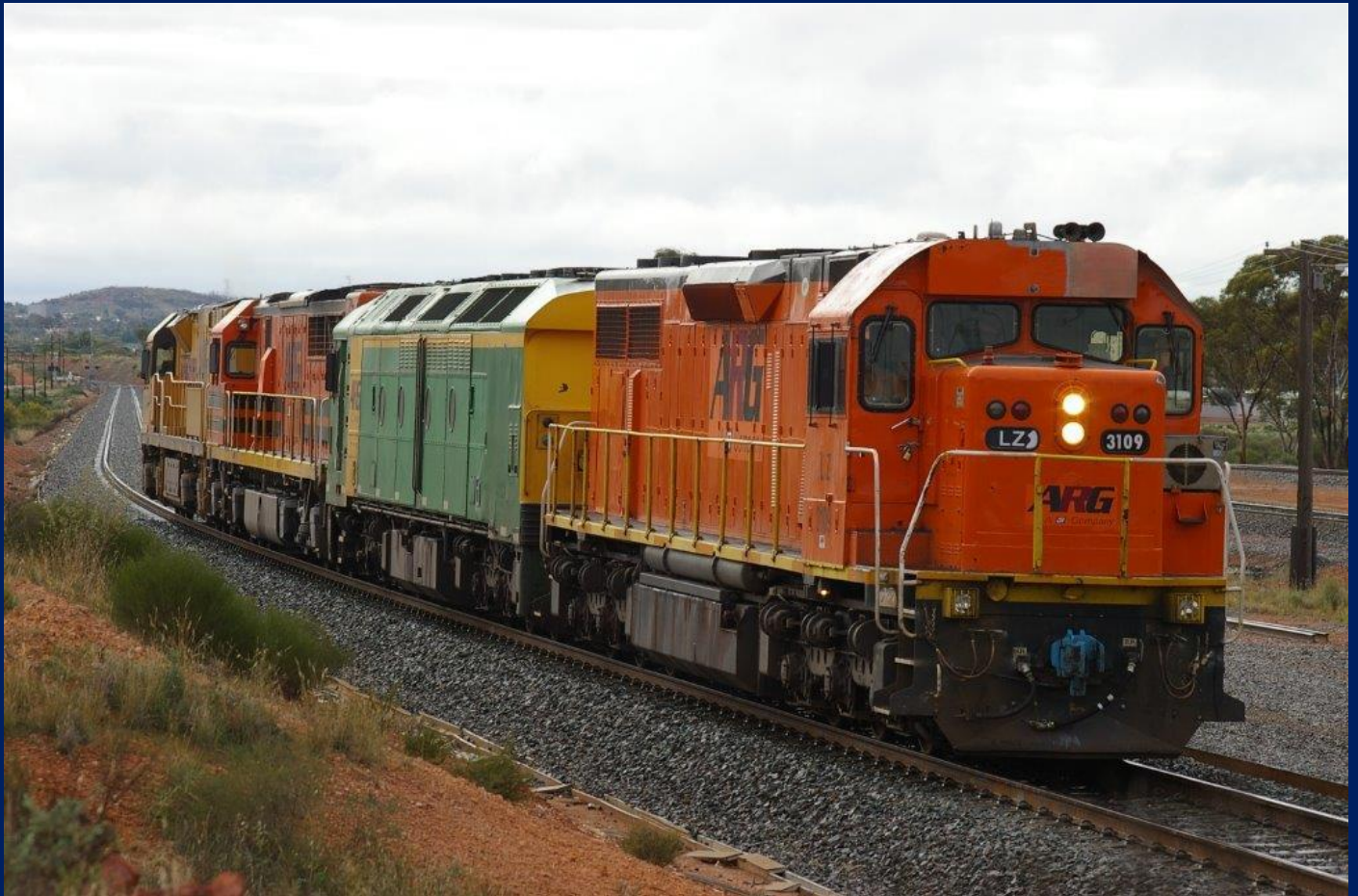
LZ3109, ALZ3208, Q4004 & AC4303 on light engine movement from Kalgoorlie loco to West Kalgoorlie 3/6.