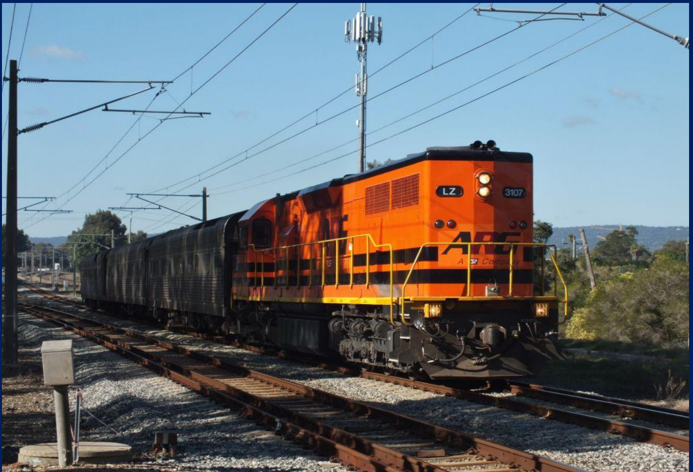
LZ3107 on 1C02 AK car inspection train to East Perth terminal at Woodbridge June 16th.