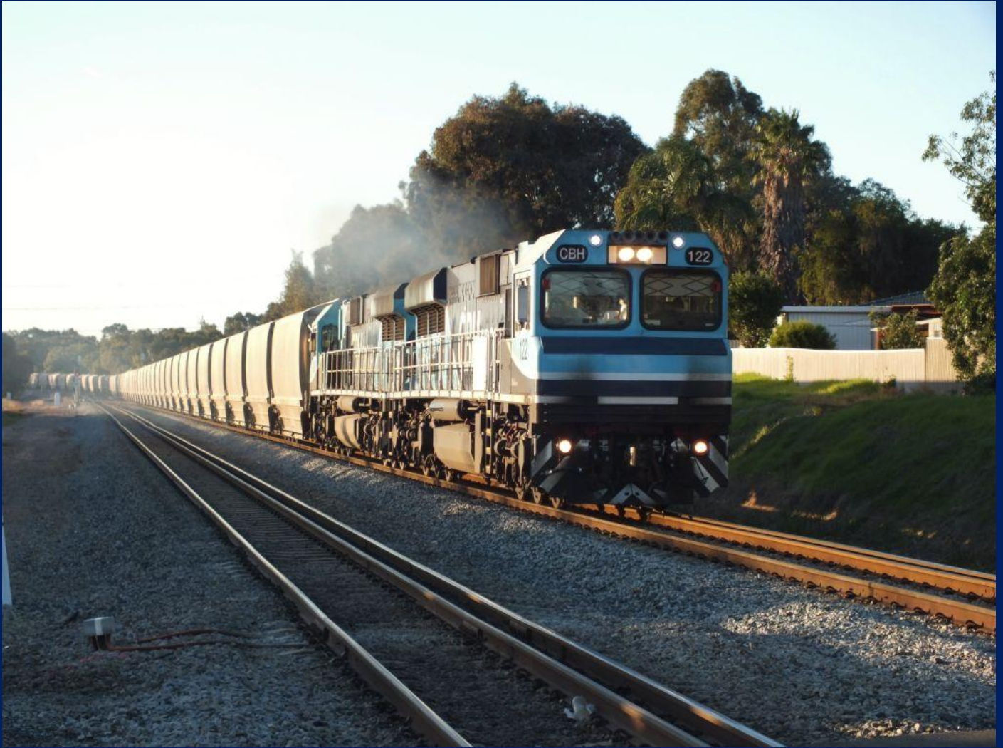
CBH122 & CBH118 on 7S56 grain climbing grade thru Hazelmere on way to Kwinana 1/6.