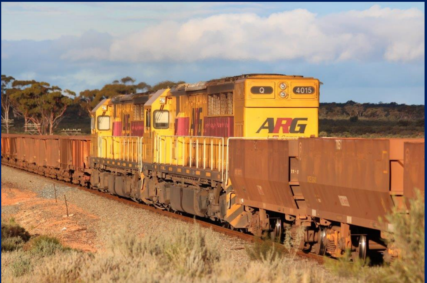
Q4015 & Q4002 dpu on 2414 empty ore at 7km on Esperance line Hampton June 3rd.