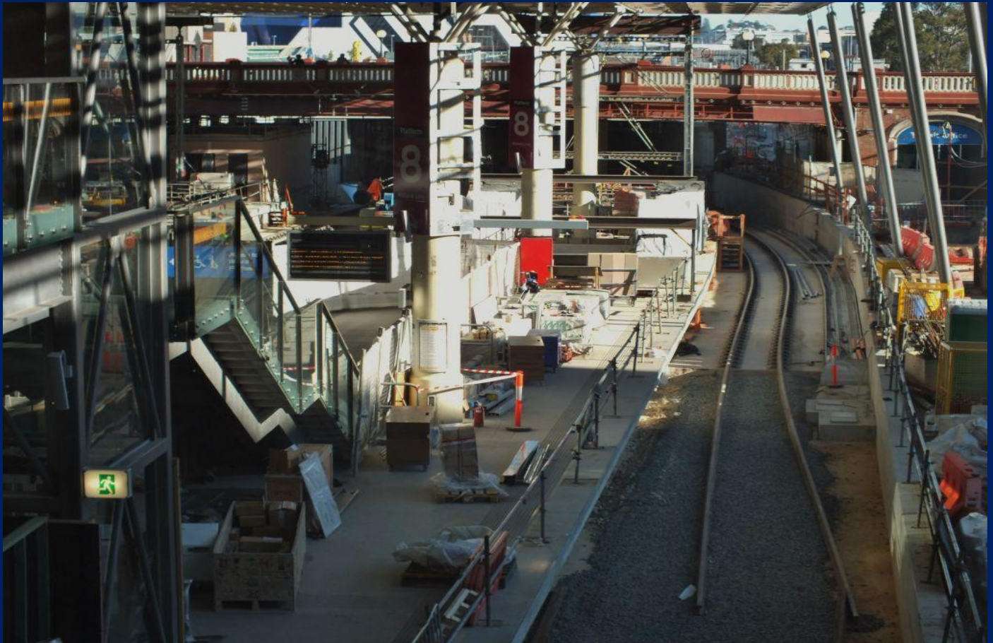
New platform 9 under construction with the track out of tunnel not connected yet 30/6.