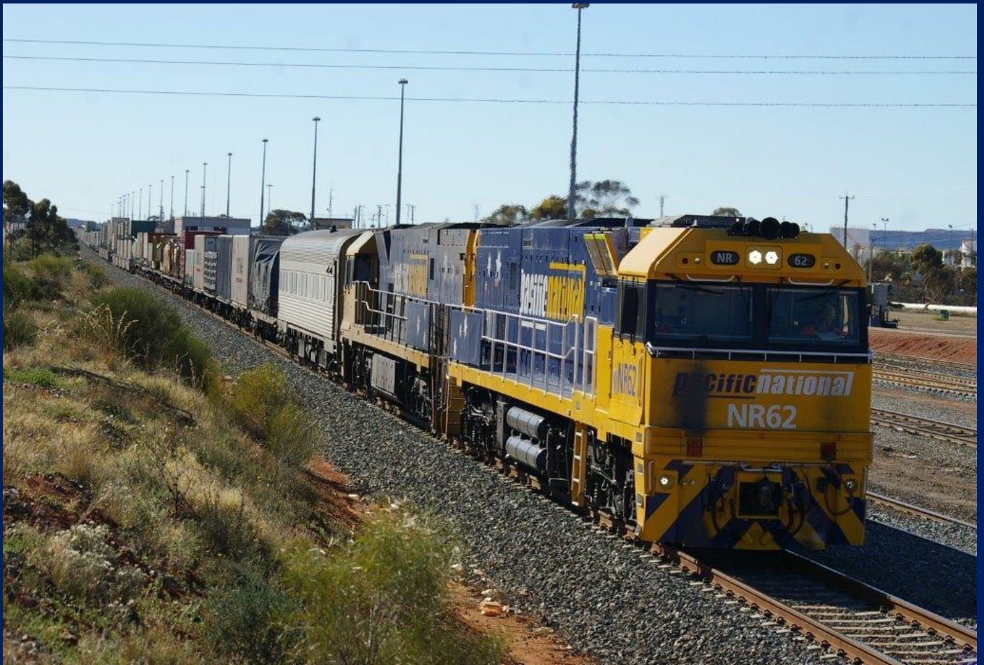
NR62 [was last NR with NR diamonds] now upgraded and repainted with NR10 on 6MP4 at WEK 30/6.