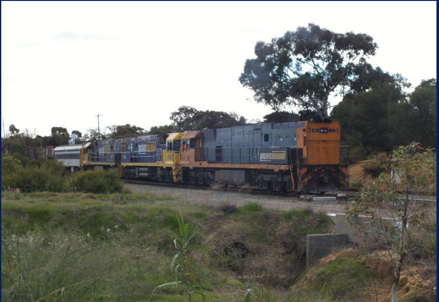
Yard shunter NR72 hauls failed 5MP5 NR57/NR105 into Forrestfield Yard June 9th.