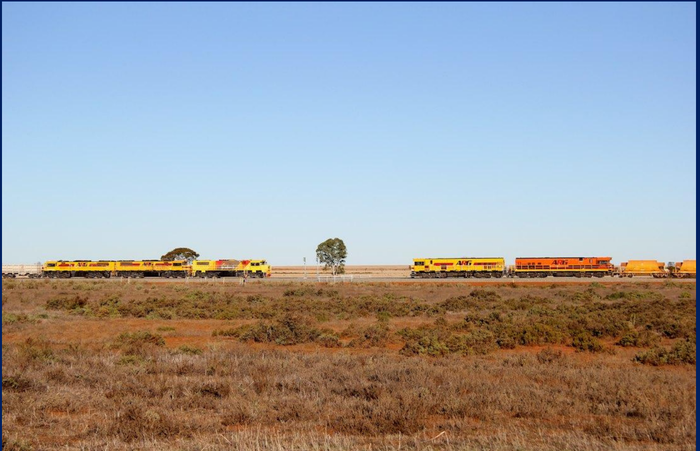
DFZ2403, DFZ2405 & DFZ2401 on loaded Karara ore ex Perenjori crosses P2514 & P2503 on empty Mt Gibson Ruvidini ore at Tenindewa May 12th.