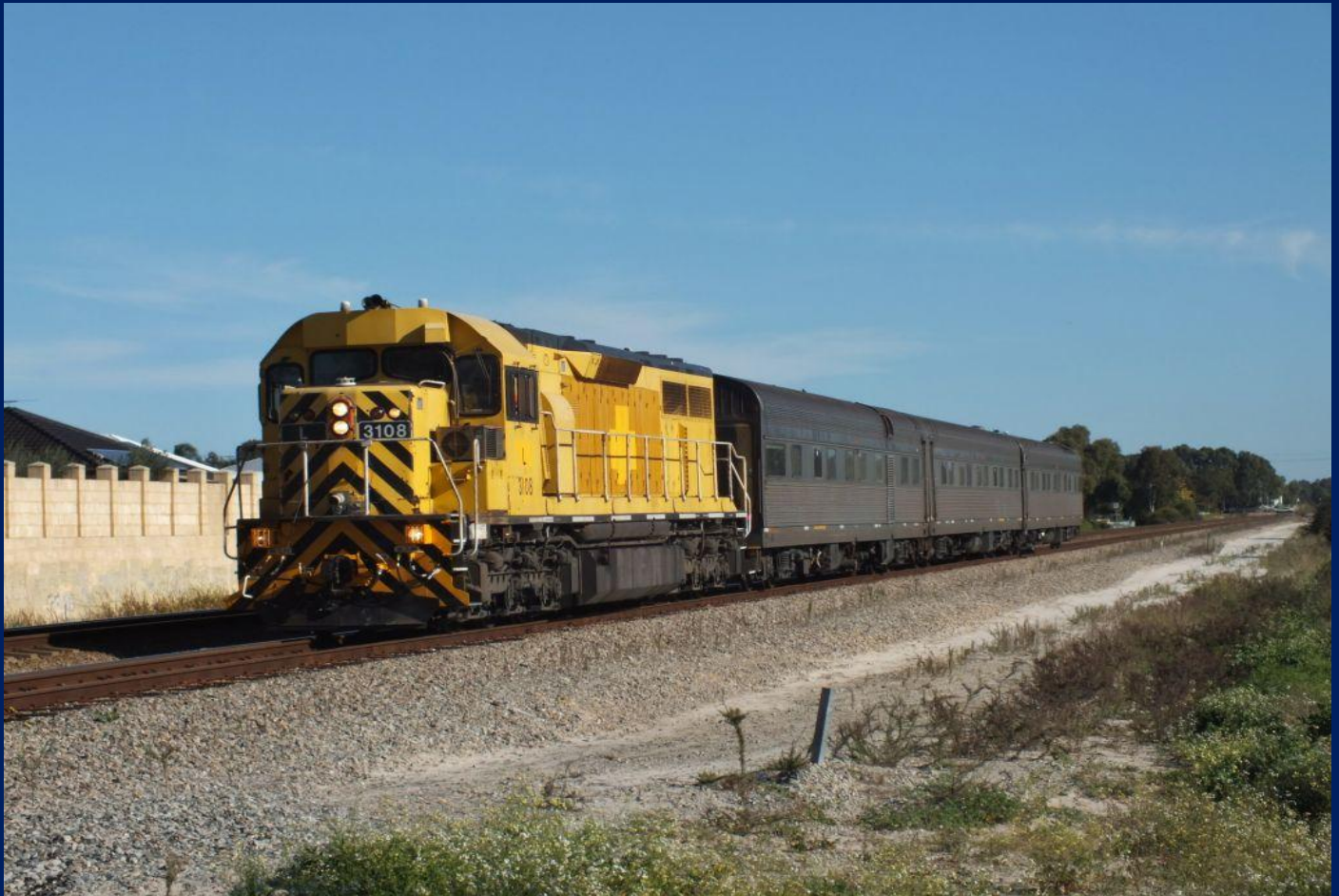
LZ3108 on 4C05 AK car inspection train at Thornlie June 12th.