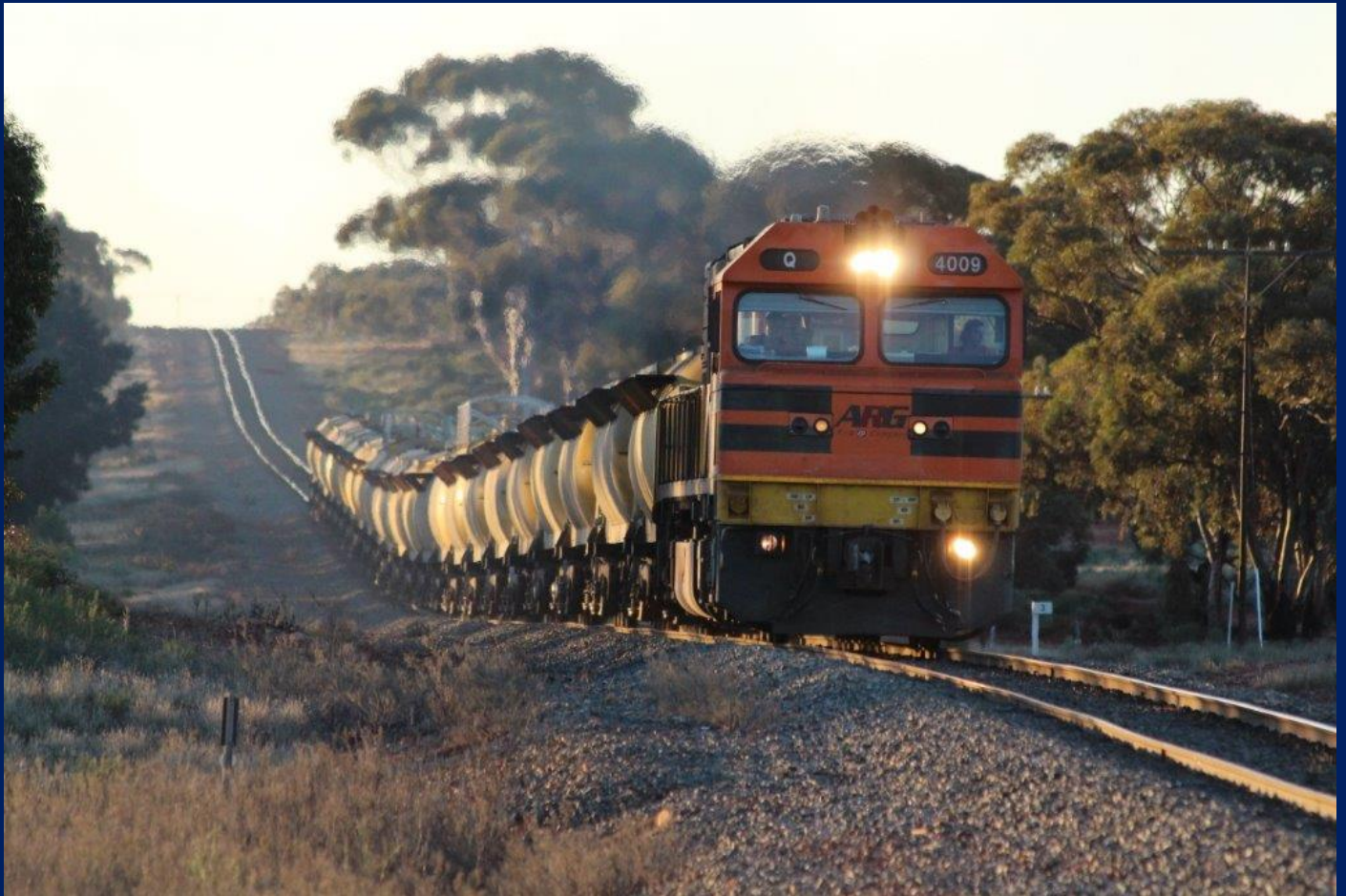
Q4009 on 1478 nickel on the roller coaster Leonora line approaching Kalgoorlie 30/6.