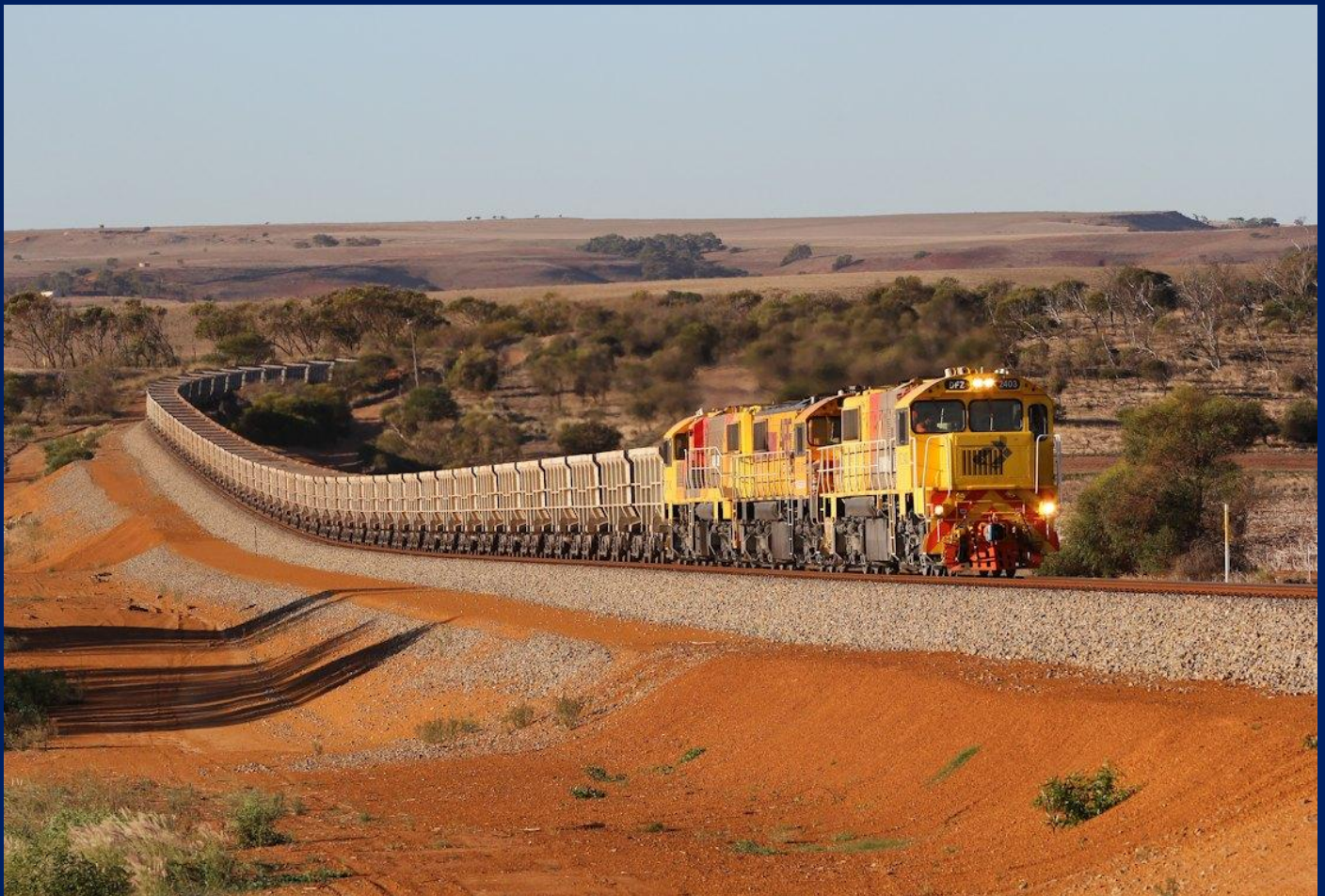
DFZ2403, DFZ2401 & DFZ2402 on Karara ore ex Perenjori at Moonyoonooka 4/5.