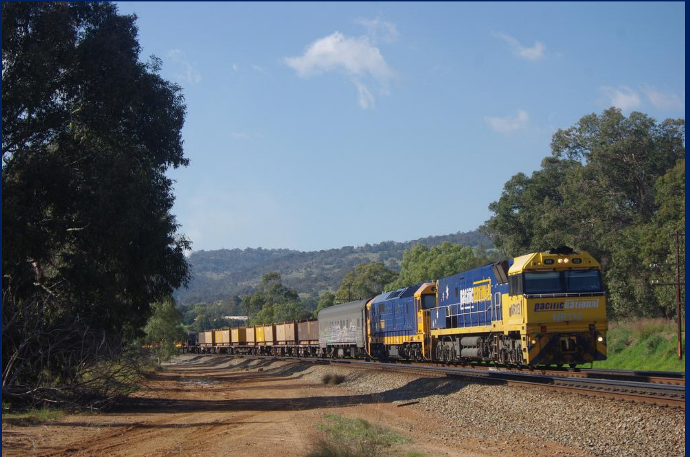
NR113 with dead attached 8118 [new Kewdale shunter] on 4WP2 at Millendon 16/6.