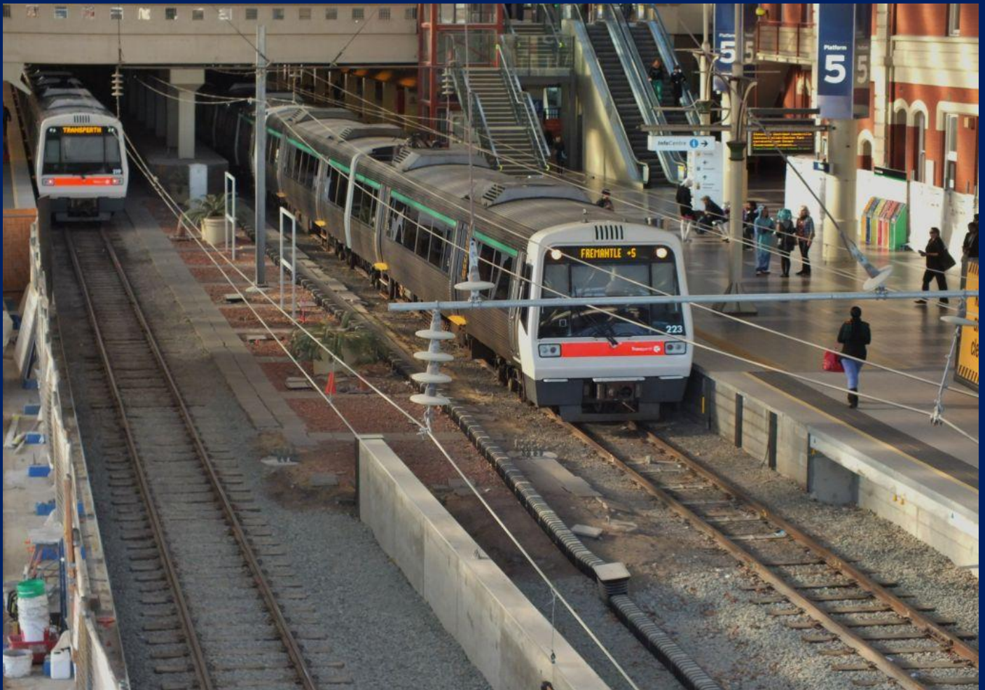
Platforms 5 and 6 Perth Station in use for Fremantle Armadale services June 30th.