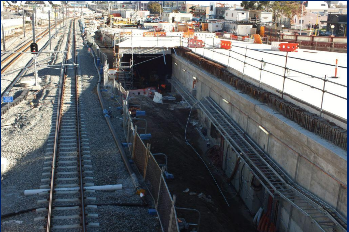
Perth Station platform 6 line is on the left with yet to be completed platform 6 connection through to the Fremantle line tunnel is to the right June 30th.