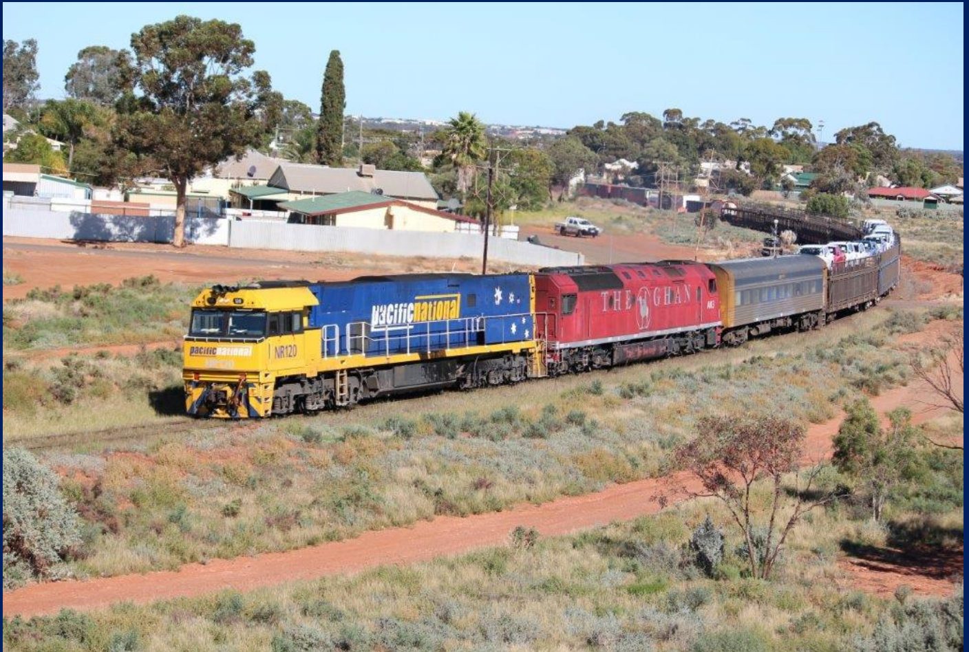
NR120 & AN3 on 6PM6 intermodal departing Kalgoorlie for Parkeston on 24/5.