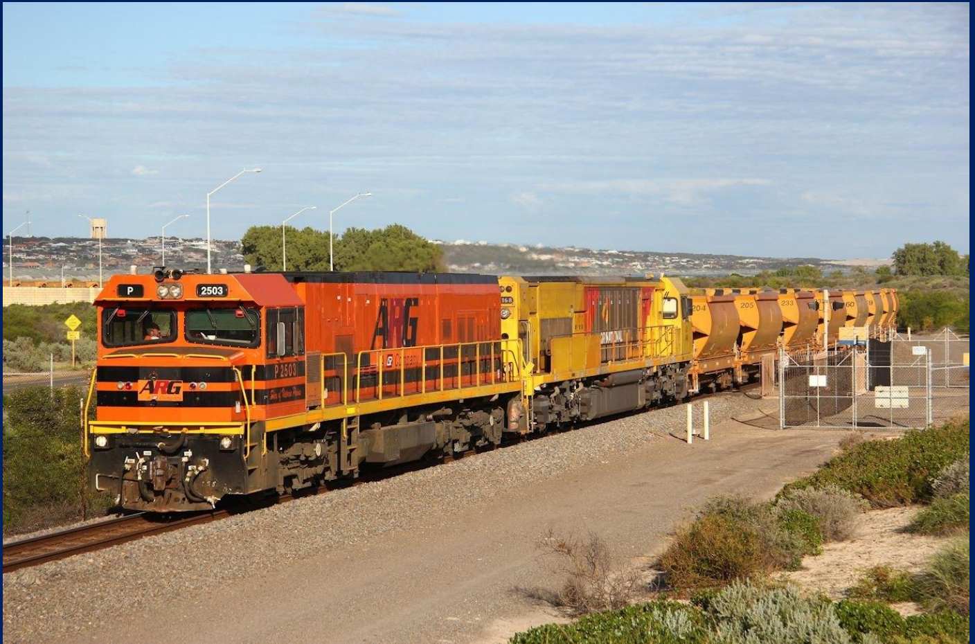
Rare P2503, ACN4168 used on Mt Gibson Ruvidini ore approaching Geraldton Port 25/5.