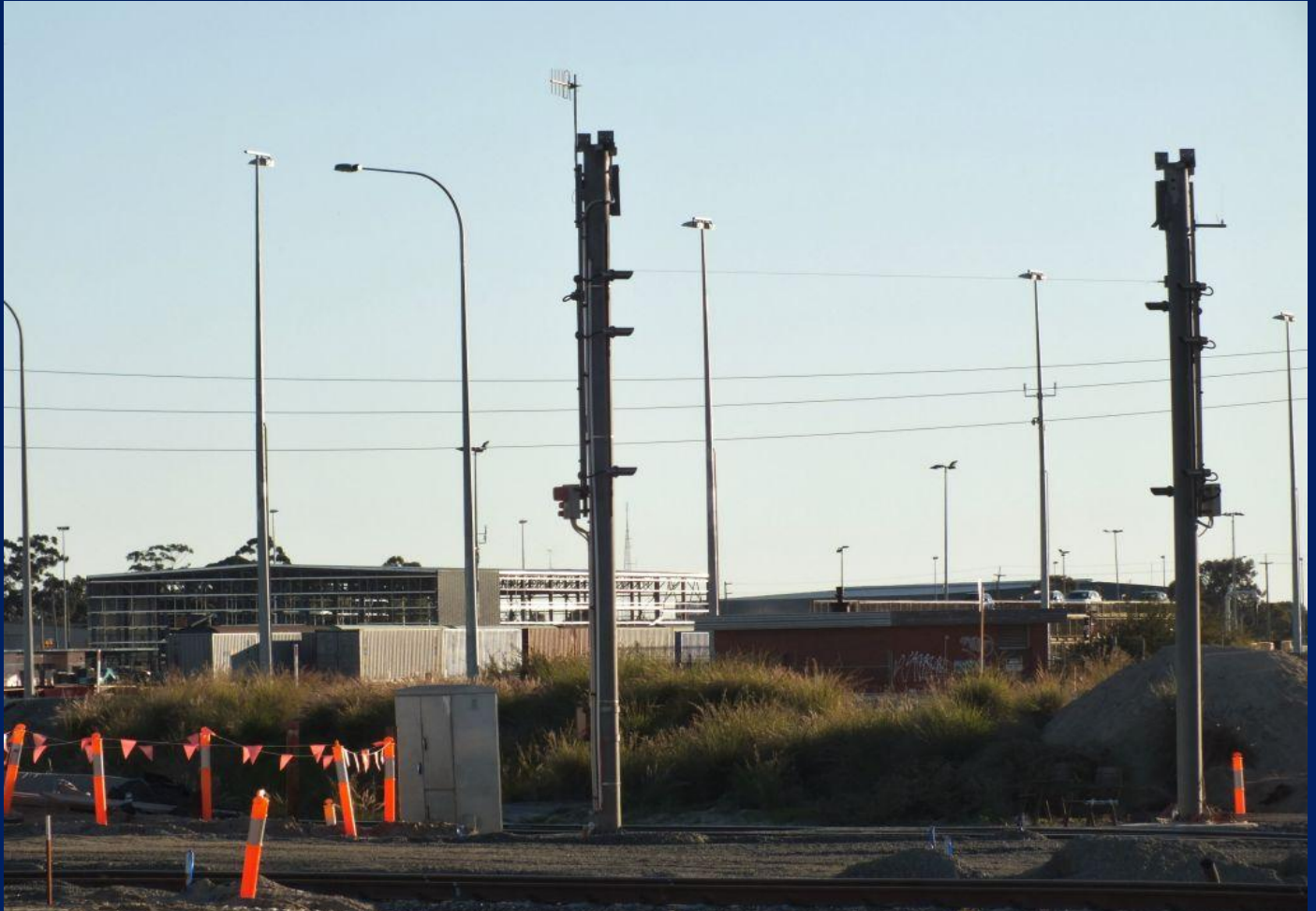
New out of gauge detectors at the entrance to Pacific National Kewdale Yard June 30th.