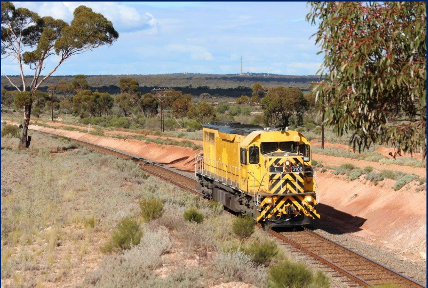
L3108 runs 4BK4 light engine from Hampton ballast pit to West Kalgoorlie 16/6.