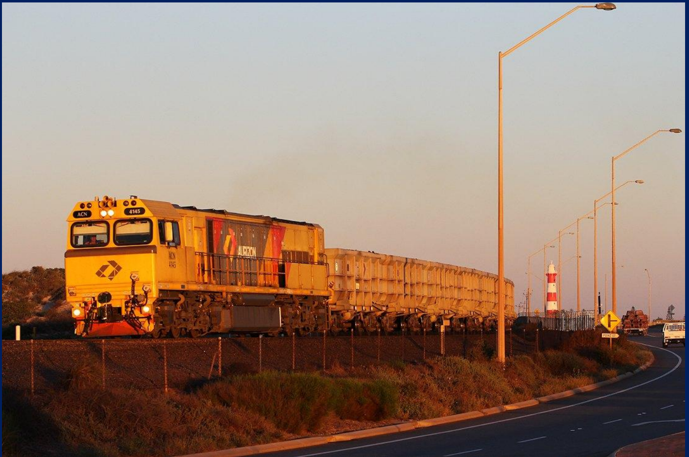
ACN4145 leads empty ore train out of Geraldton Port with historic lighthouse at sunset 4/5.