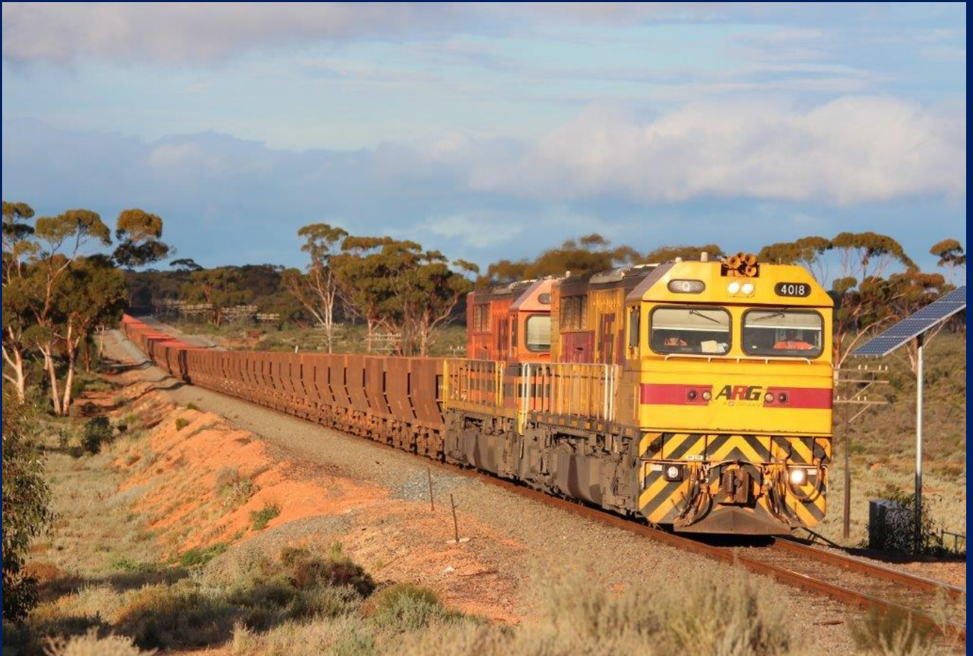
Q4018 & Q4003 dpu Q4015 & Q4002 on 2414 empty ore 7km June 3rd.