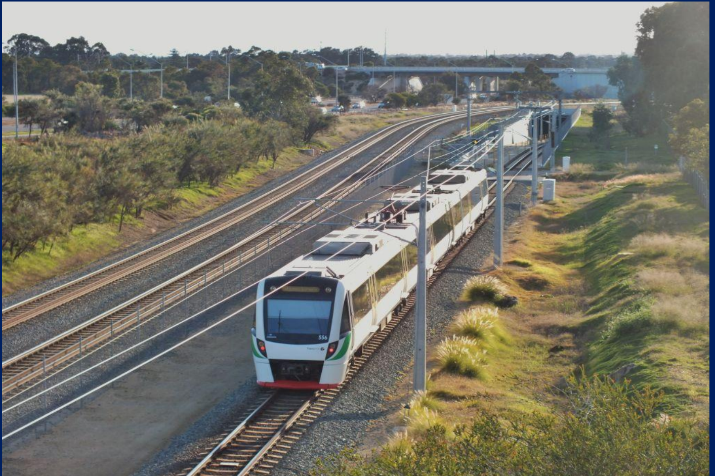
EMU B series set 56 runs Thornlie to Perth service towards Maddington 12/6.