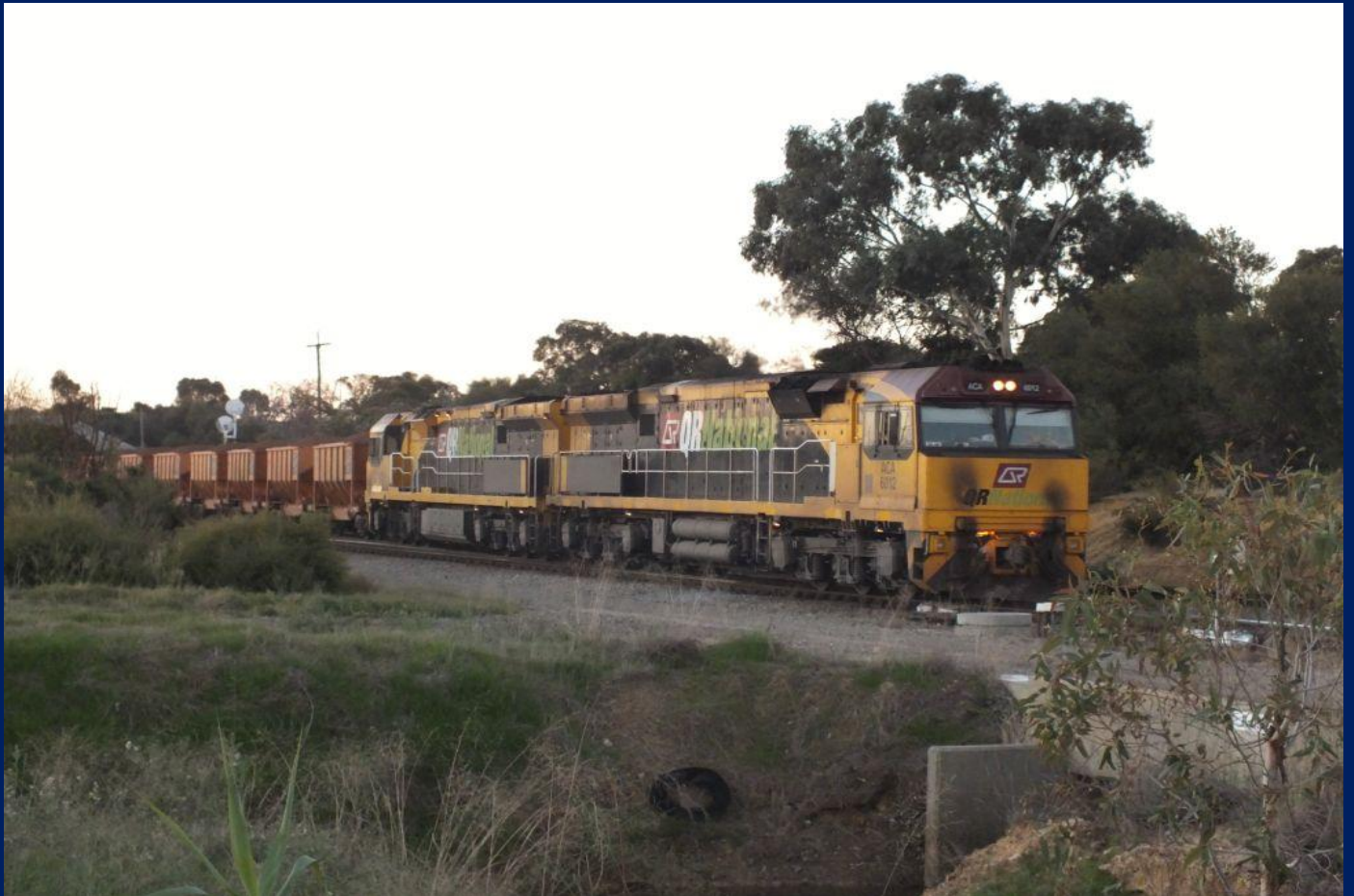
ACA6012 & ACA6009 on 7030 ore crossing over into trip service Forrestfield at dusk 1/6.