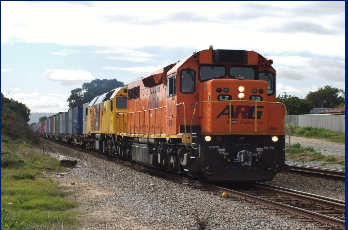
LZ3120 & DC2205 on 3142 container train running wrong line at Thornlie June 18th.