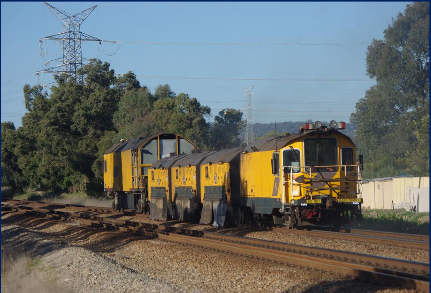
Aurizon rail grinder MY32 at Swan View on June 13th.