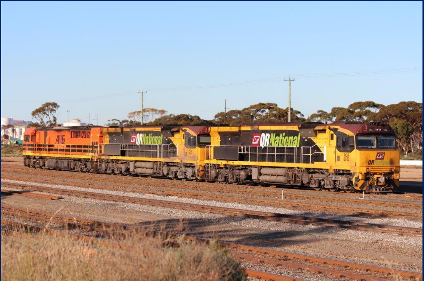
ACA6012, ACA6002 & Q4004 WEK yard waiting for 7426 freight to be made up 29/6.