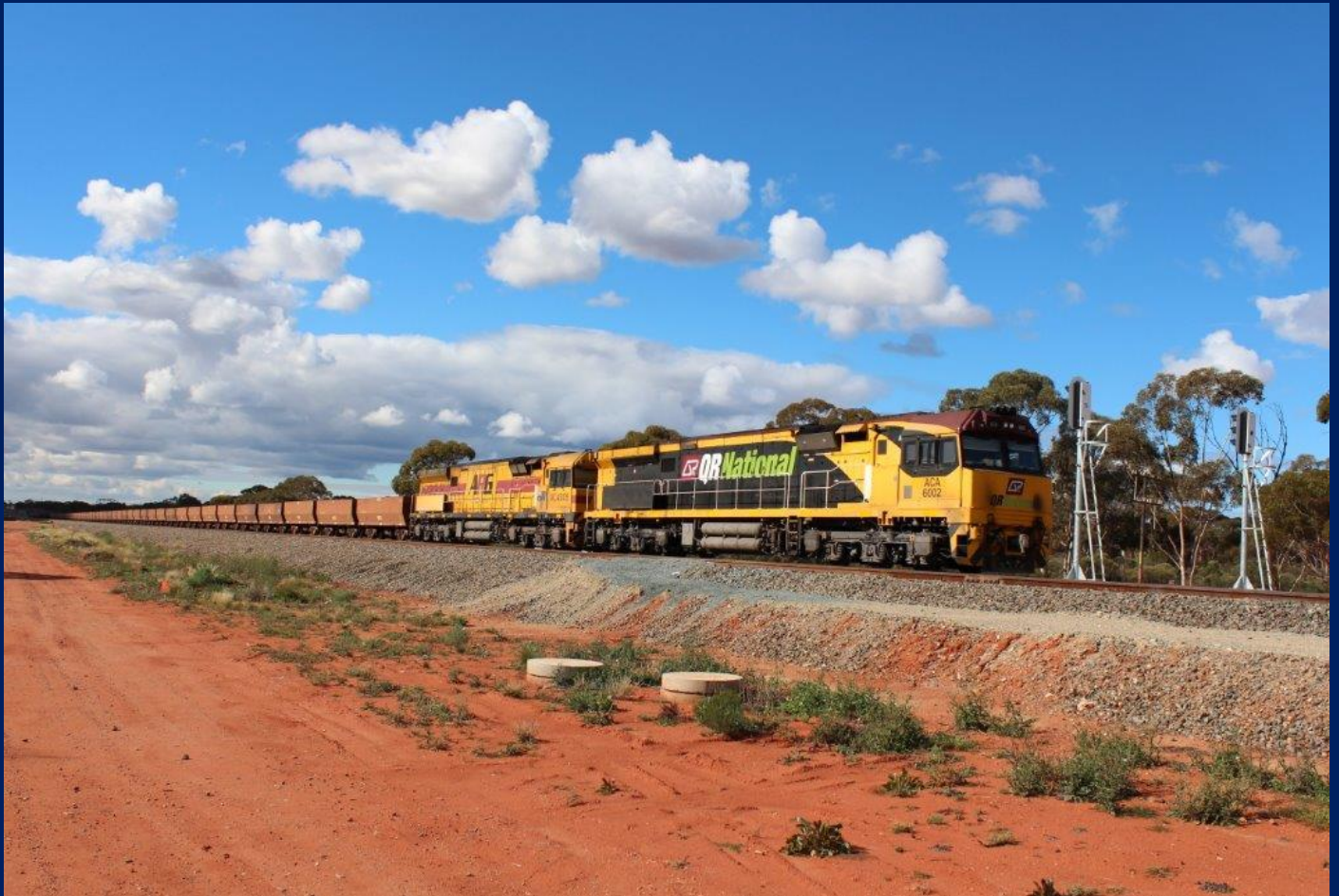
ACA6002 & AC4305 on 1414 empty ore Binduli June 16th.