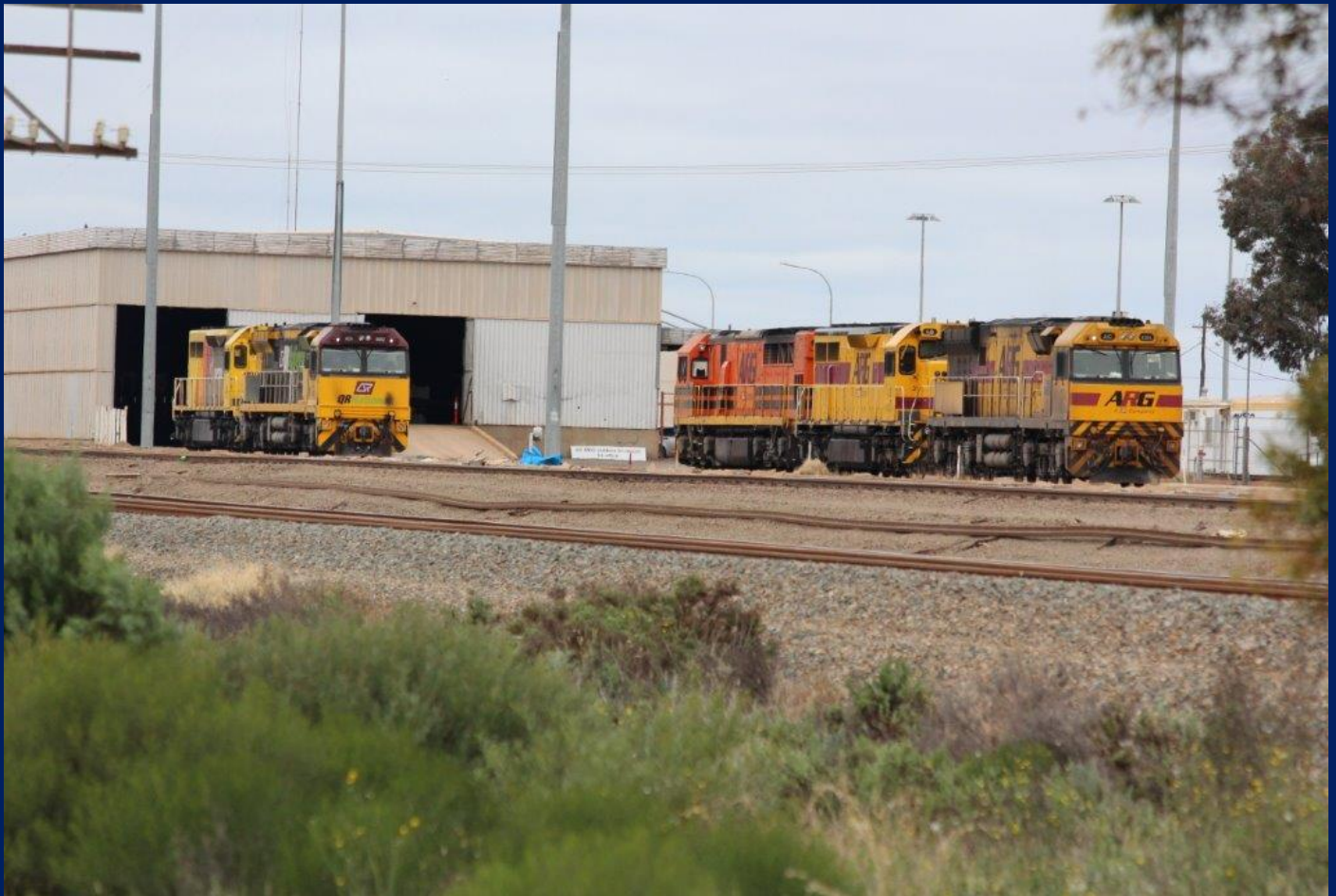
AC4304, LQ3121, Q4009, ACA6002, LZ3103, four different liveries stabled in West Kalgoorlie yard 2/6.