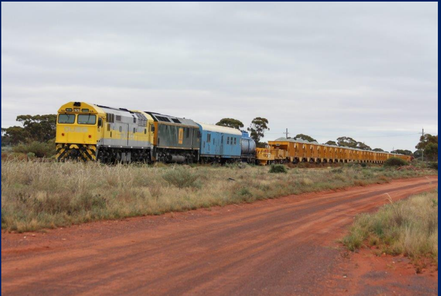
8030 & RL301 on loaded ballast in Engineers siding Parkeston June 2nd.