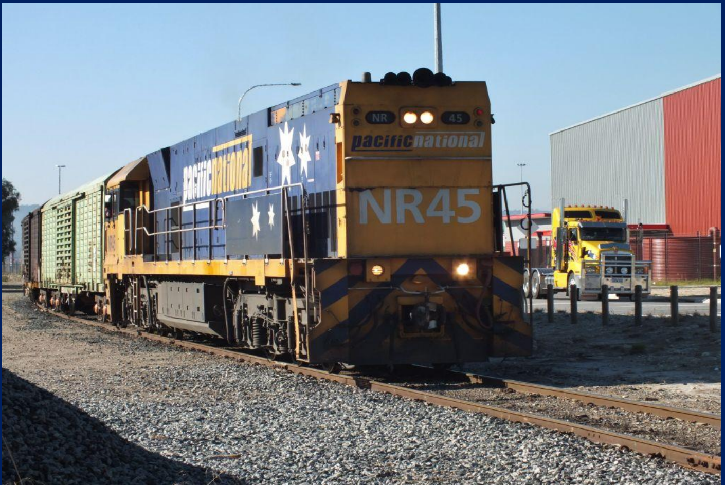
NR45 Kewdale yard shunter on 1P52 vans to Sadleir Logistics Kewdale June 16th.