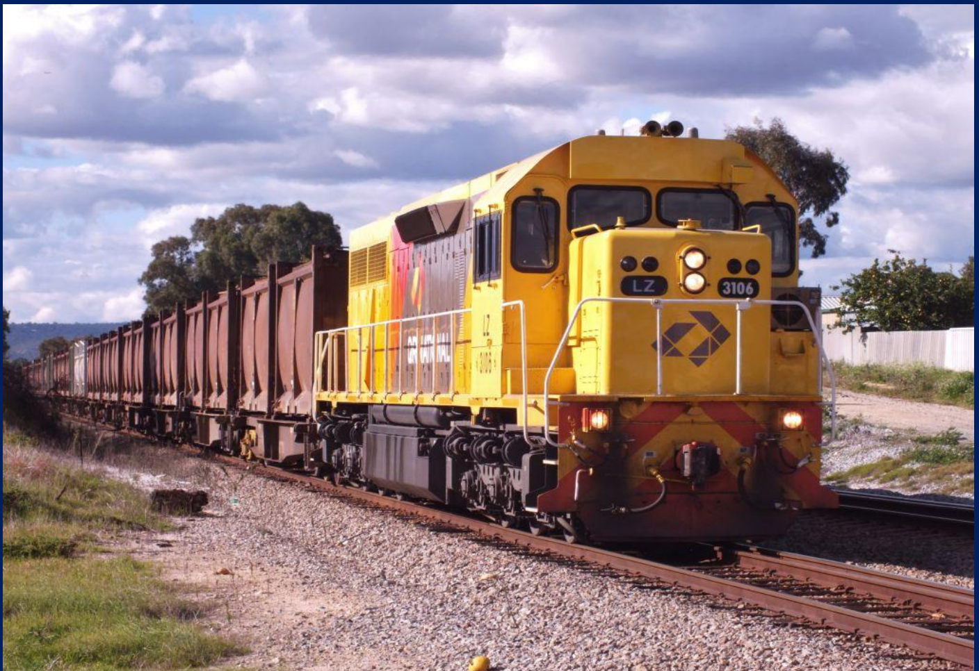
LZ3106 on 2430 empty sulphur at Thornlie running wrong line owing to track works 19/6.