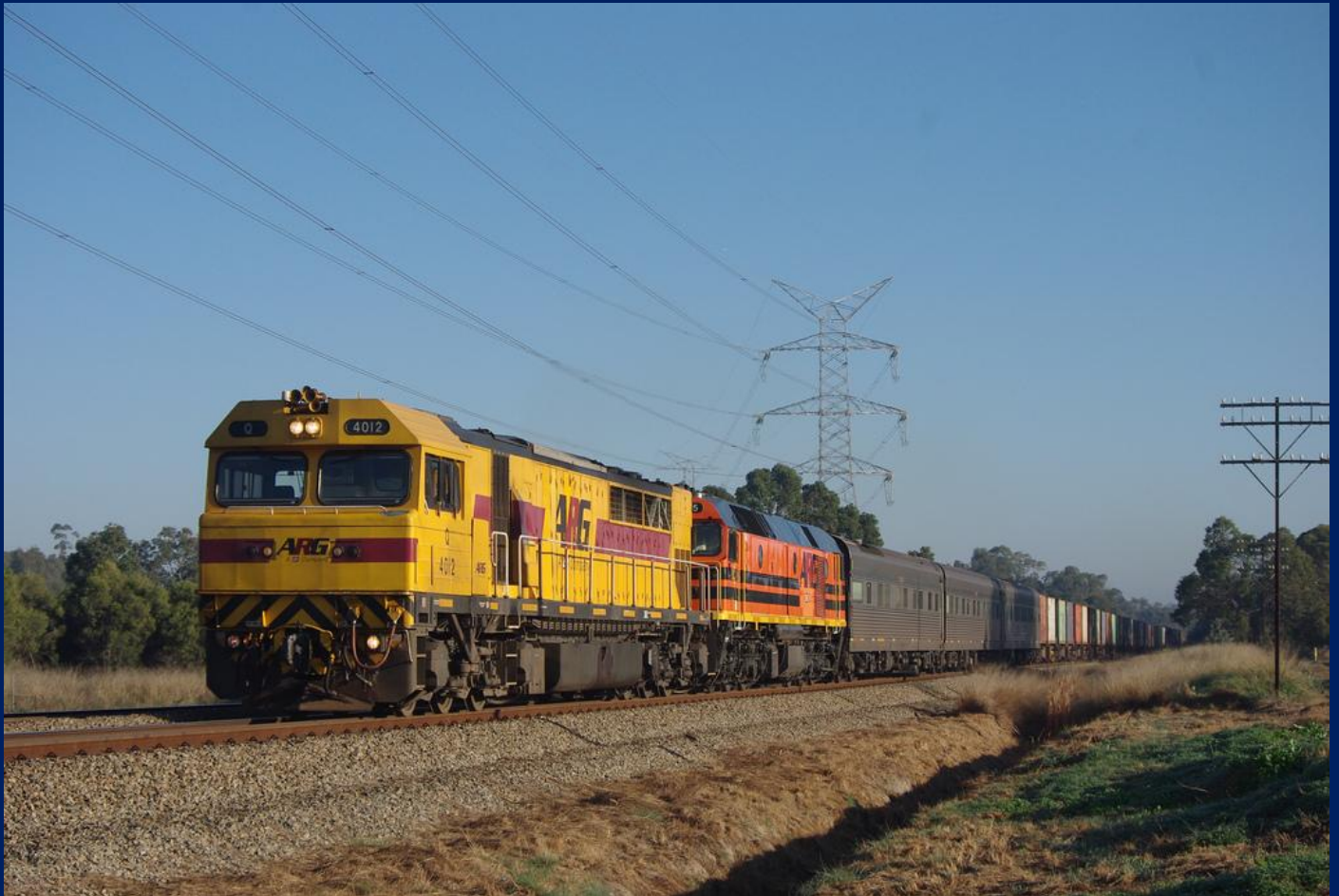
Q4012 & DC2215 AK car inspection train on 7430 empty sulphur at Middle Swan 16/6.