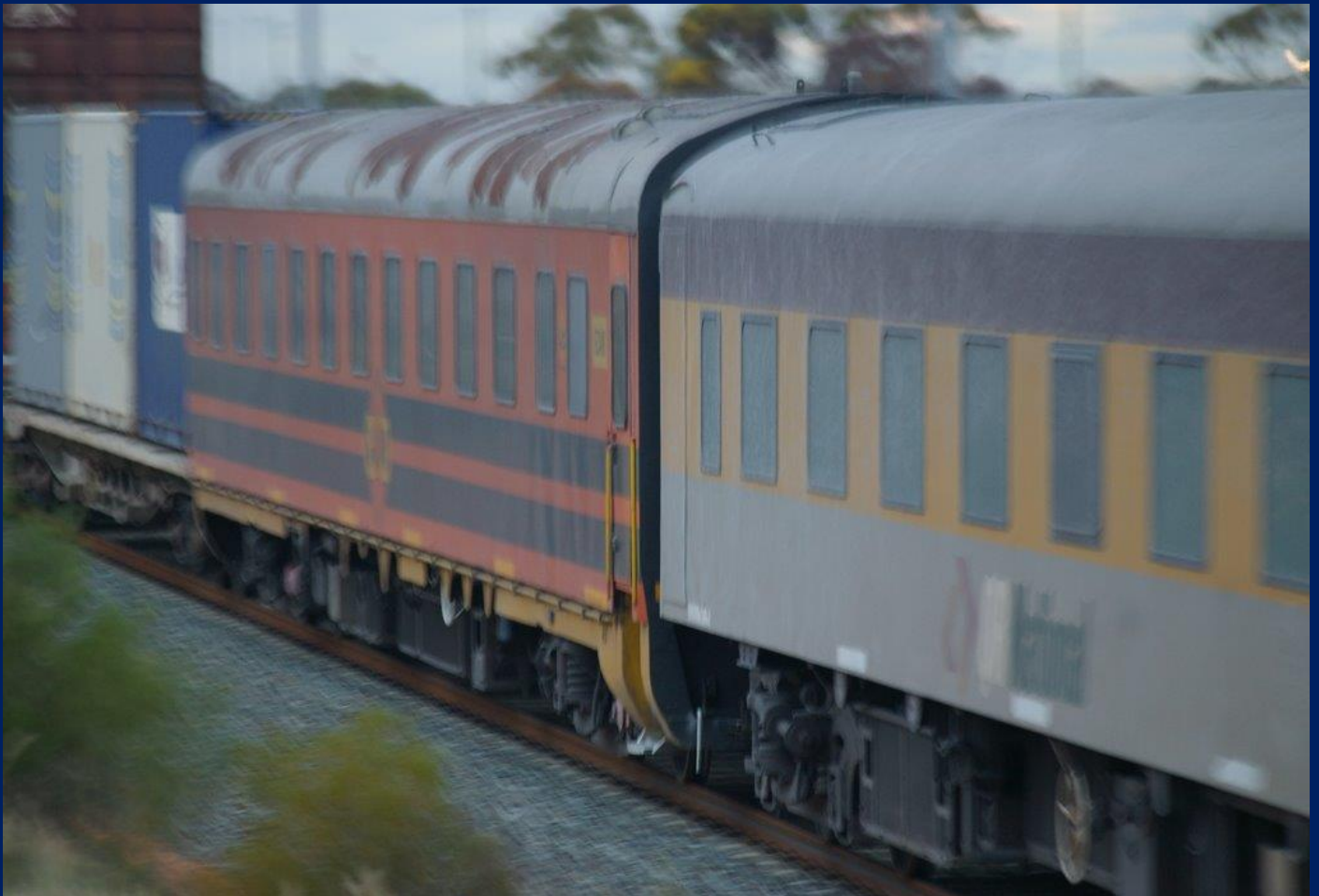
G&W crew car ECA98 on 6MP1 Aurizon intermodal WEK at dusk on way to Gemco F/F for overhaul 15/6.