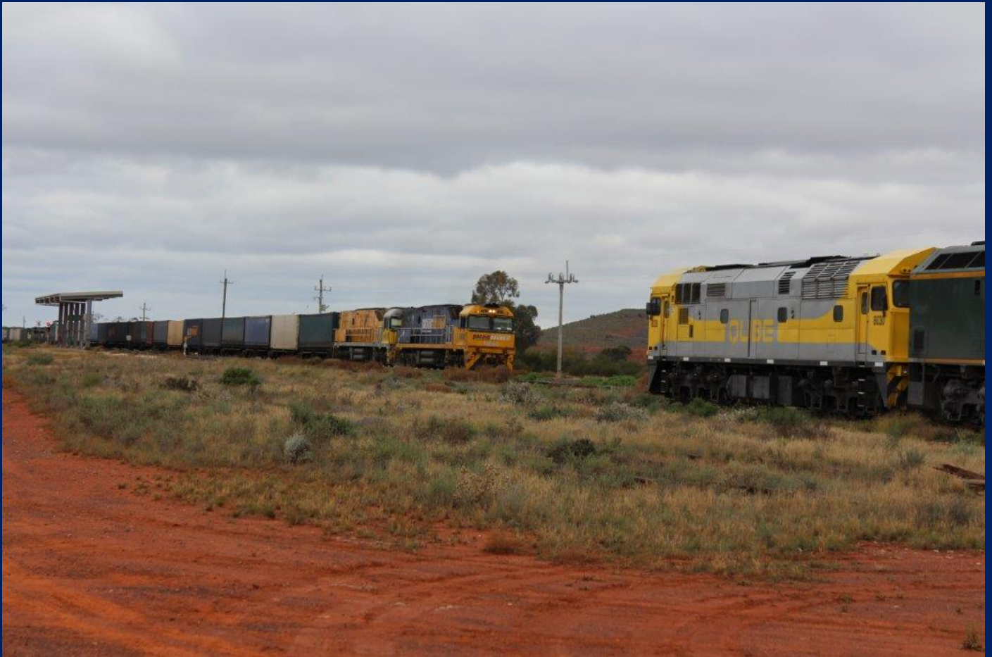
8030 & RL301 on ballast train Parkeston crossing NR80 & NR18 on 7PM7 2/6.