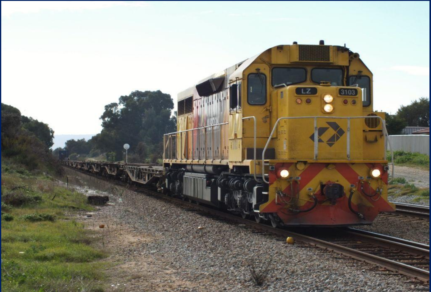
LZ3103 on 3196 container train running wrong line at Thornlie June 18th.