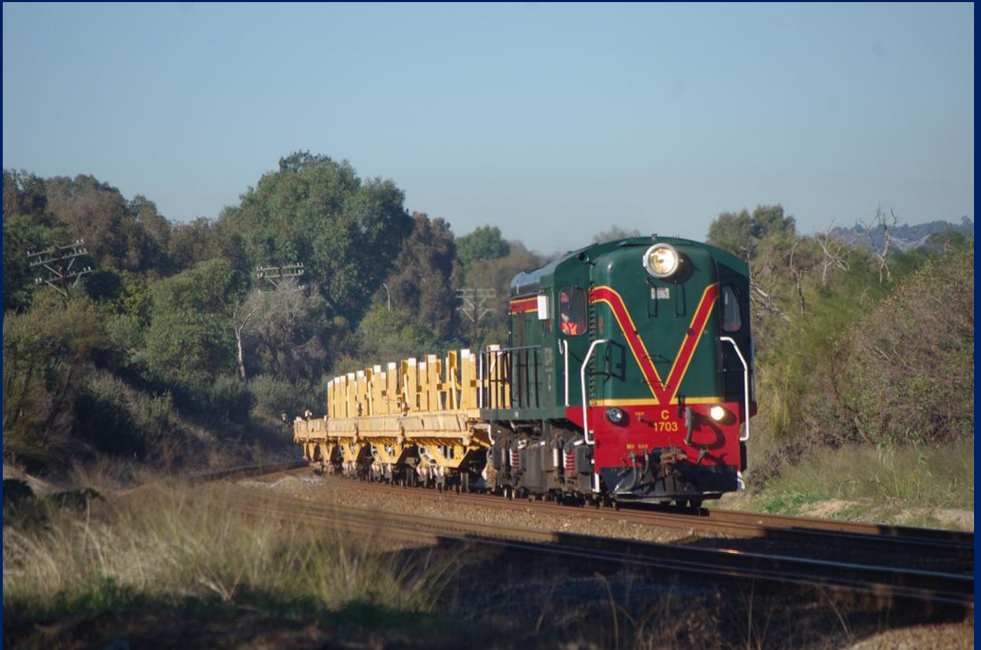
Preserved C1703 on 6QB3 empty rail train at Swan View June 28th.