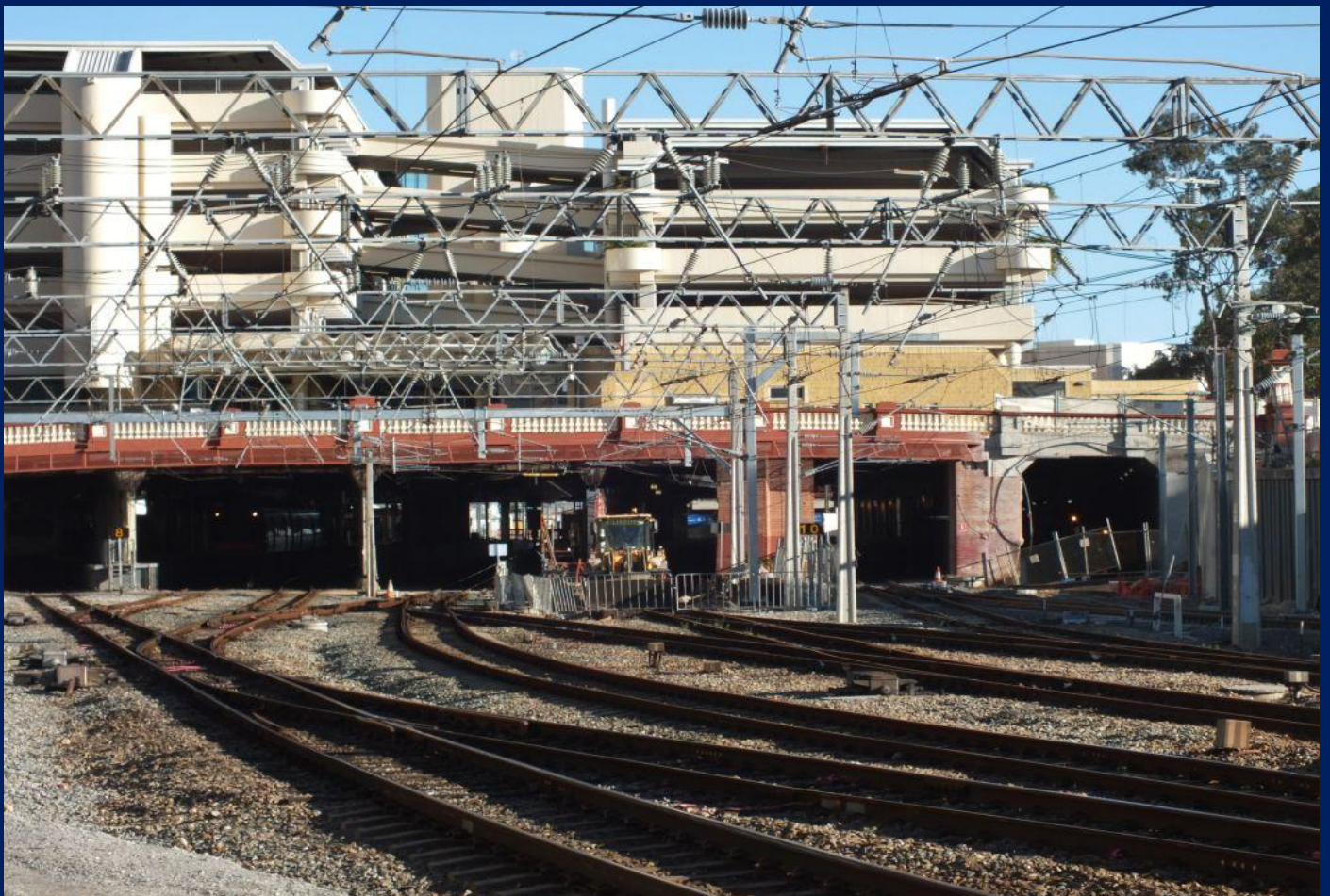
Perth Station showing new line to new platform 9 and track works on east end 30/6.