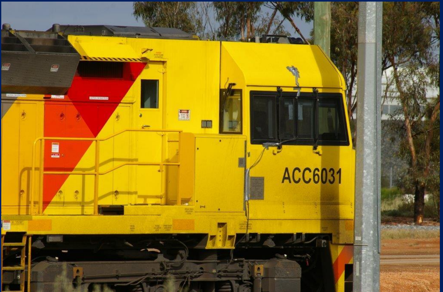
ACC6031 with test cables attached to side of cab at West Kalgoorlie June 15th.