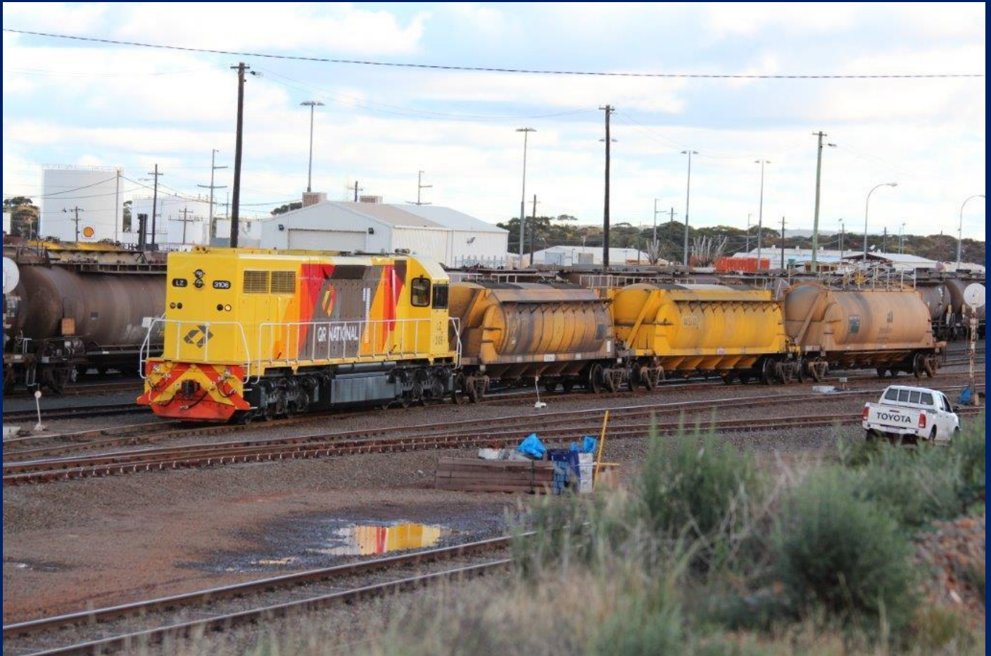
LZ3106 shunting nickel wagons West Kalgoorlie yard June 3rd.