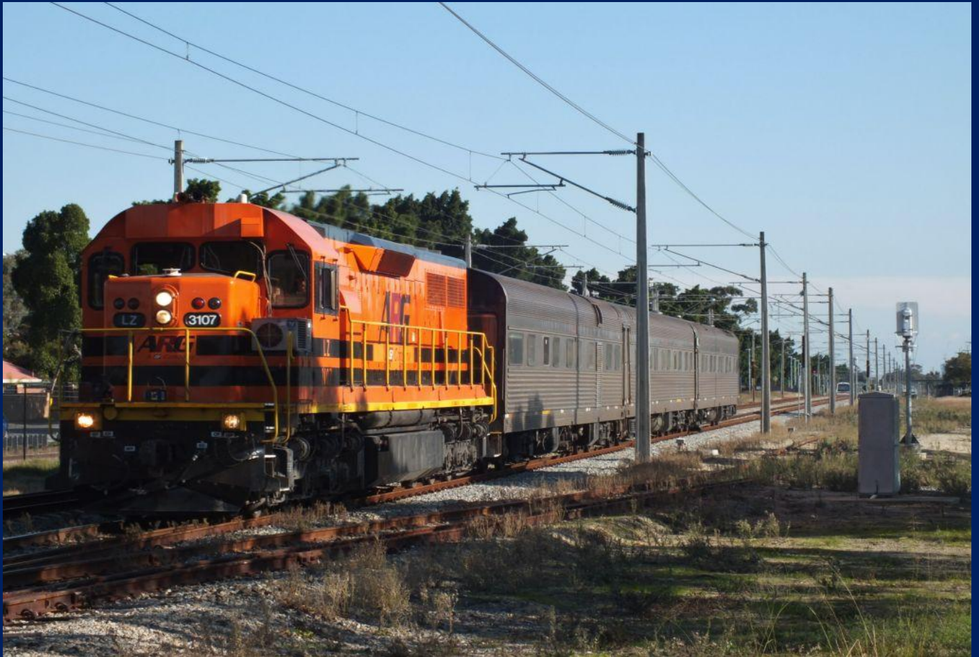
LZ3107 on 1C03 AK car inspection train passing one of two private sidings on PTA line at Bassendean 16/6.