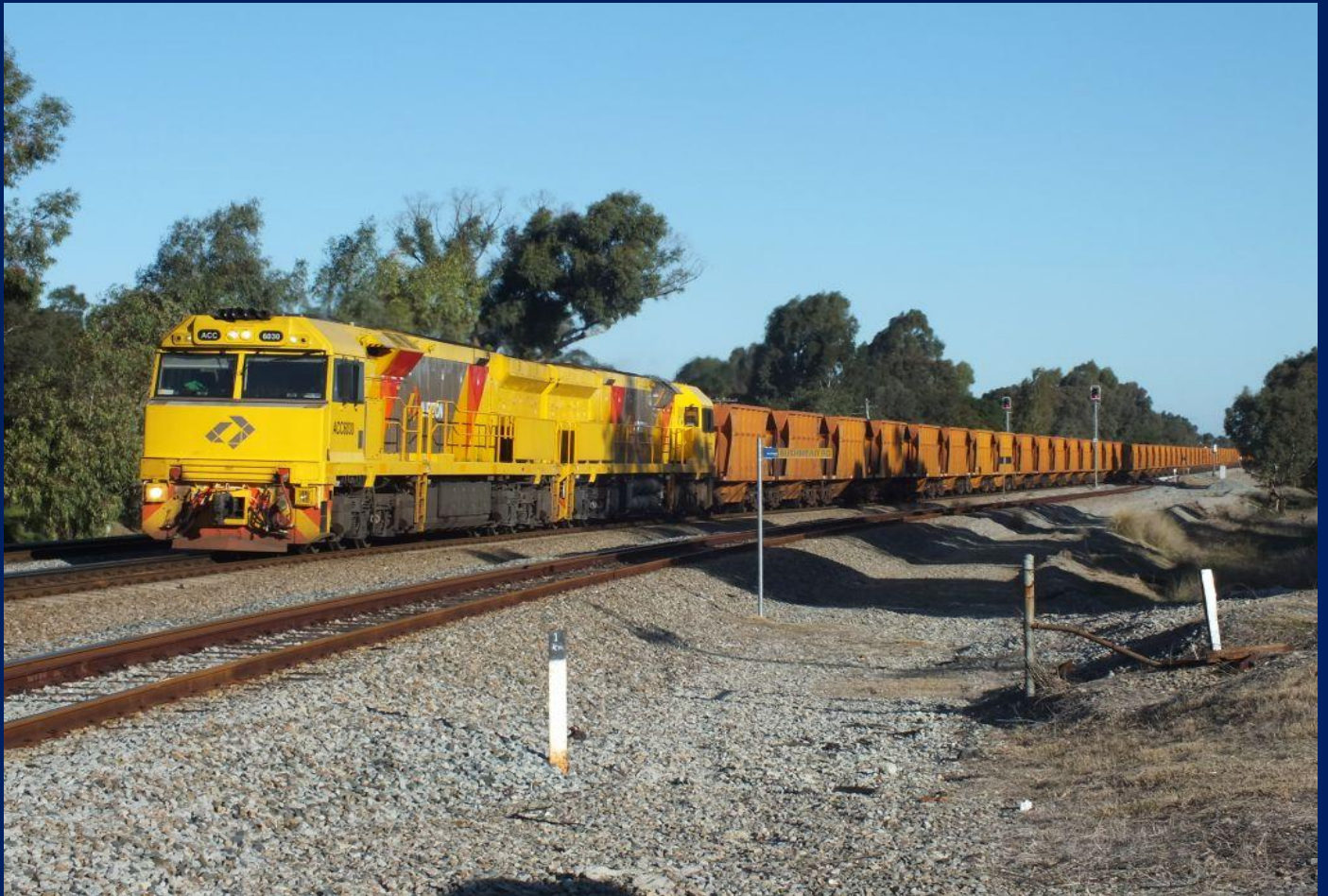
ACC6030 & ACC6032 on 7035 empty Mt Walton ore at Woodbridge June 1st.