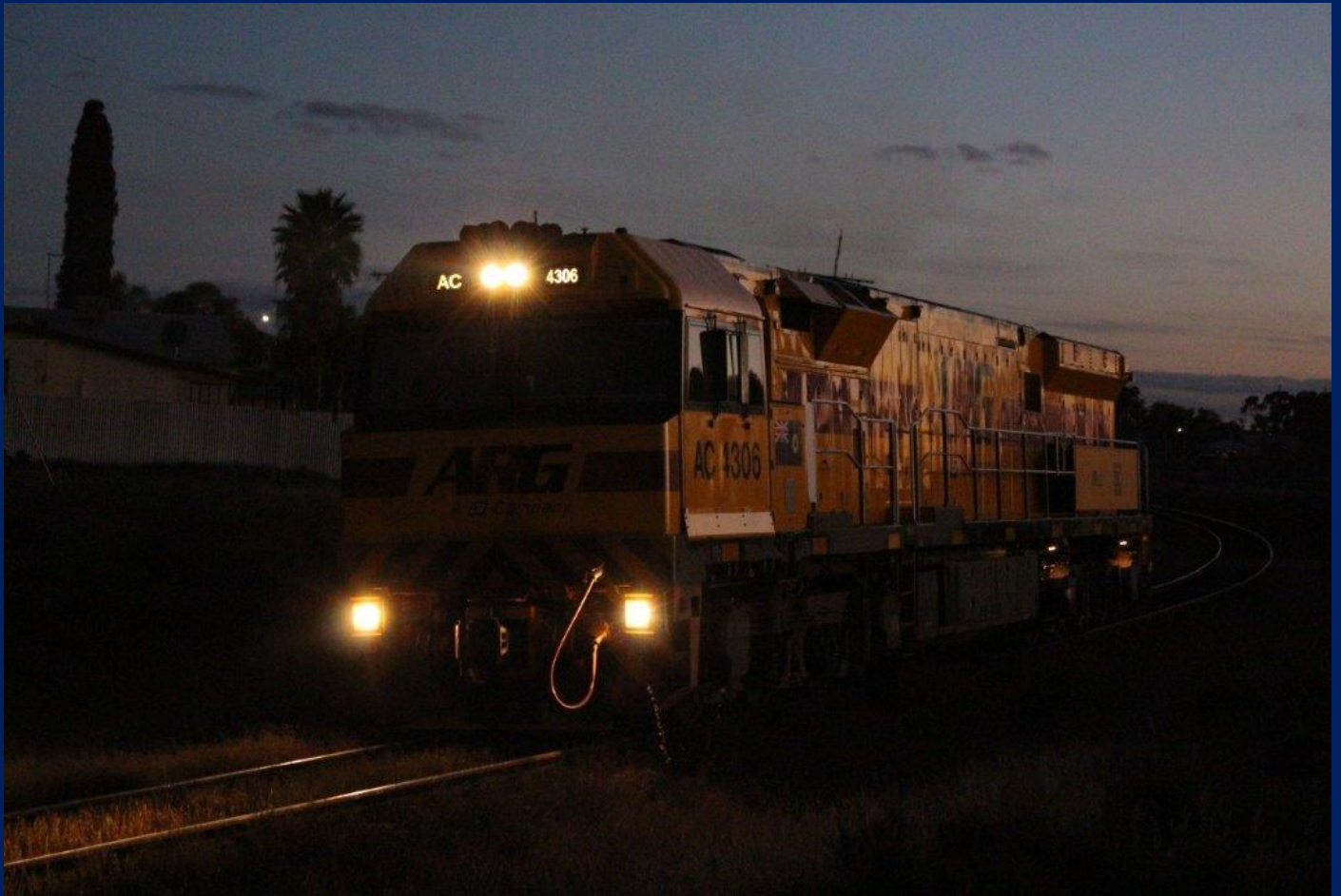
Q4005 failed to restart so AC4306 ran ex WEK to rescue Q4005 and 5MP9 at Kalgoorlie July 13th