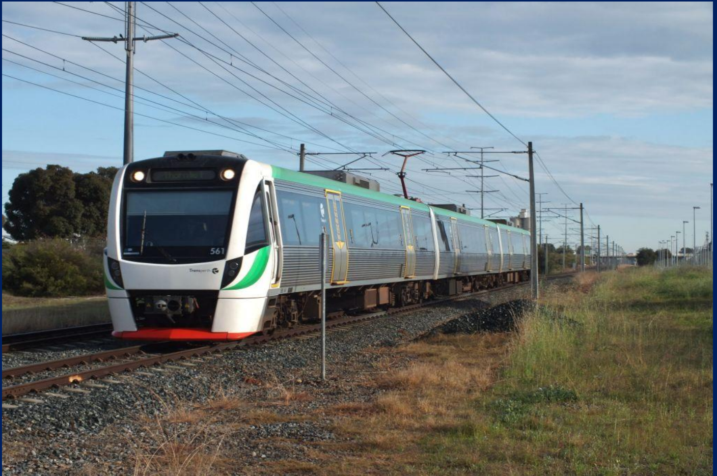
B series EMU set #61 on Thornlie service approaching Queens Park July 12th.