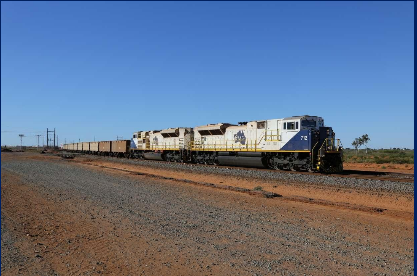
FMG SD70ACe 712 & 704 run empty ore train out of port to its yard July 21st.