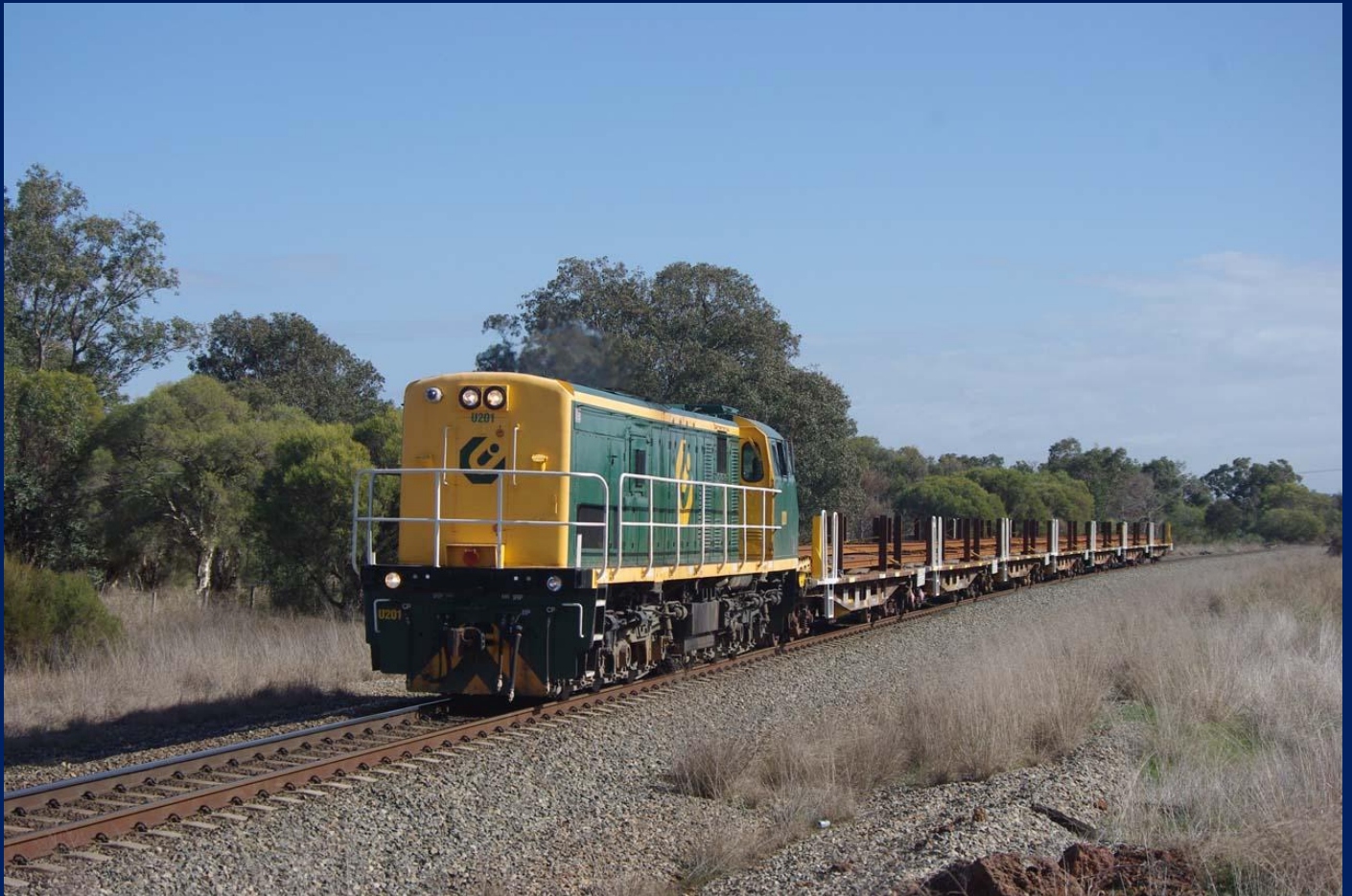
U201 on 4RT1 rail train at Mundijong Junction July 10th.