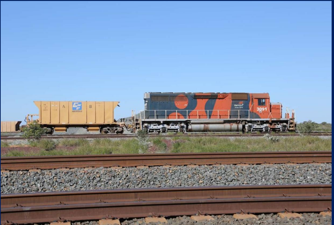
SD40R 3091 stabled on a CFCLA ballast wagon in Bing flashbutt yard July 20th.