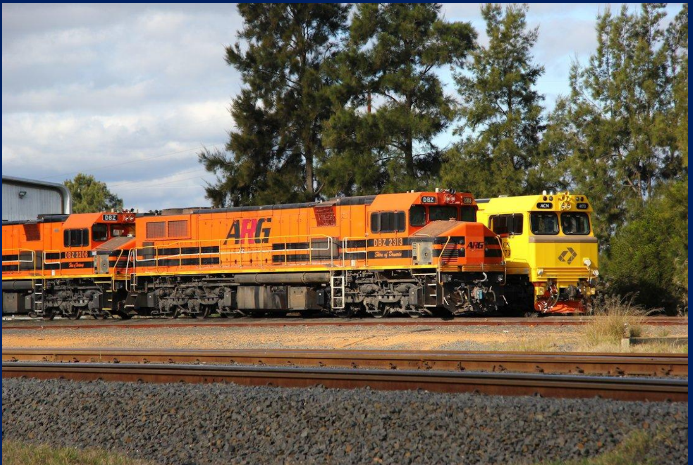
DBZ2313, DBZ2306 & ACN4173 outside service shed Picton July 20th.