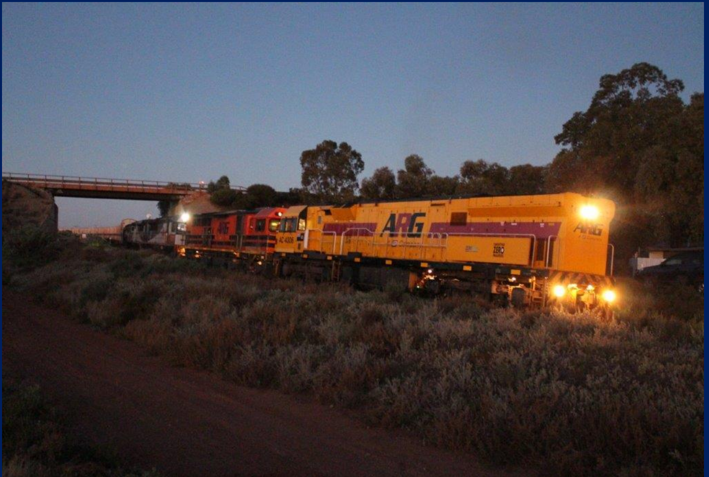
AC4306, failed Q4005 & SCT007 with SCT014 on 5MP5 departs Kalgoorlie 13/07.