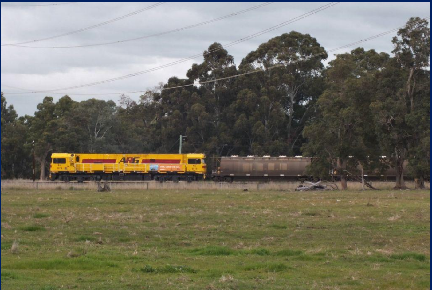
PA2819 on empty alumina at Pinjarra east July 9th.