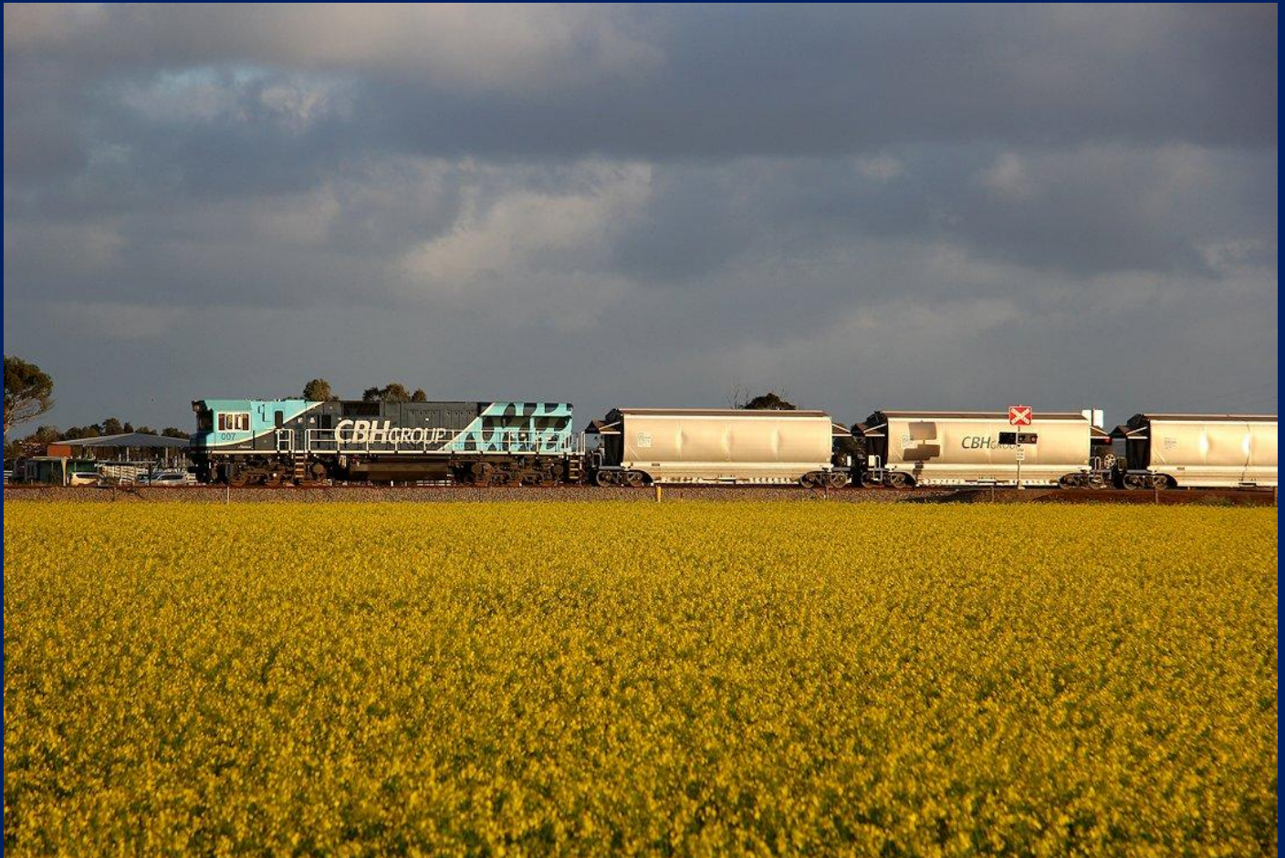
CBH007 on Watco grain at Narngulu East passing crop of Canola July 27th.