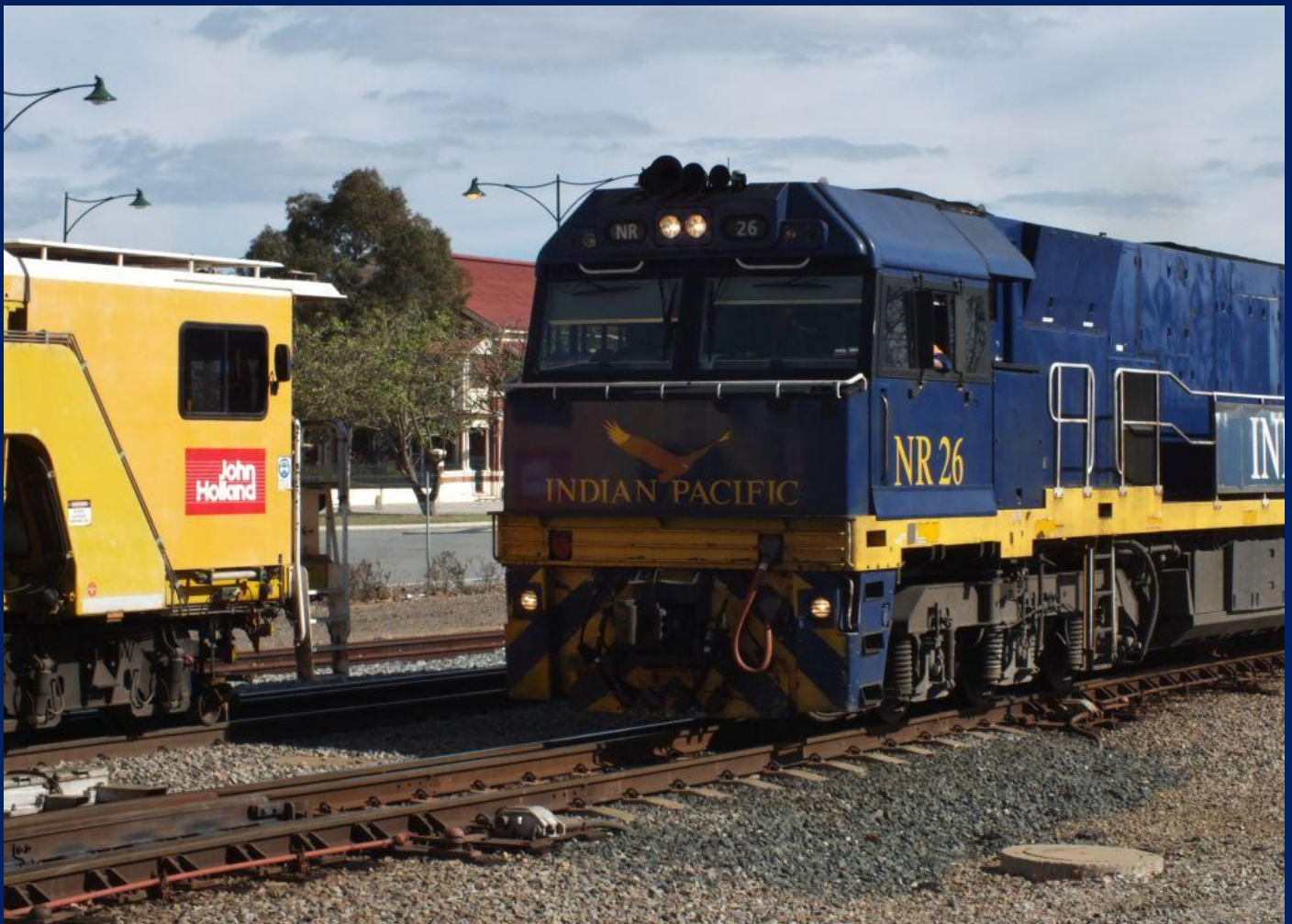
NR28 on 1PA8 Indian Pacific passes track machine TM500 at Midland July 21st.