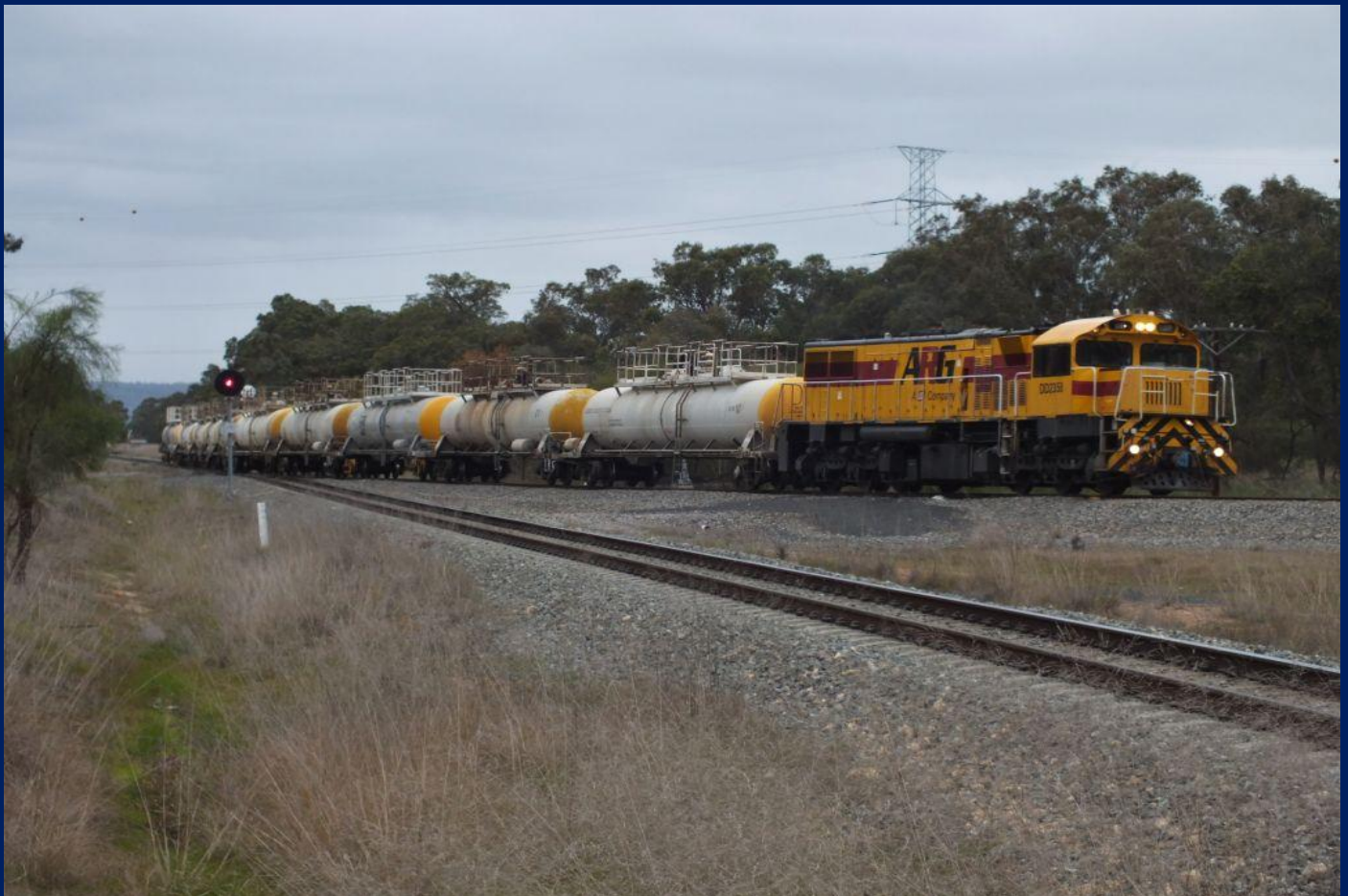
DD2358 on empty caustic tankers to Picton at Pinjarra east July 9th.