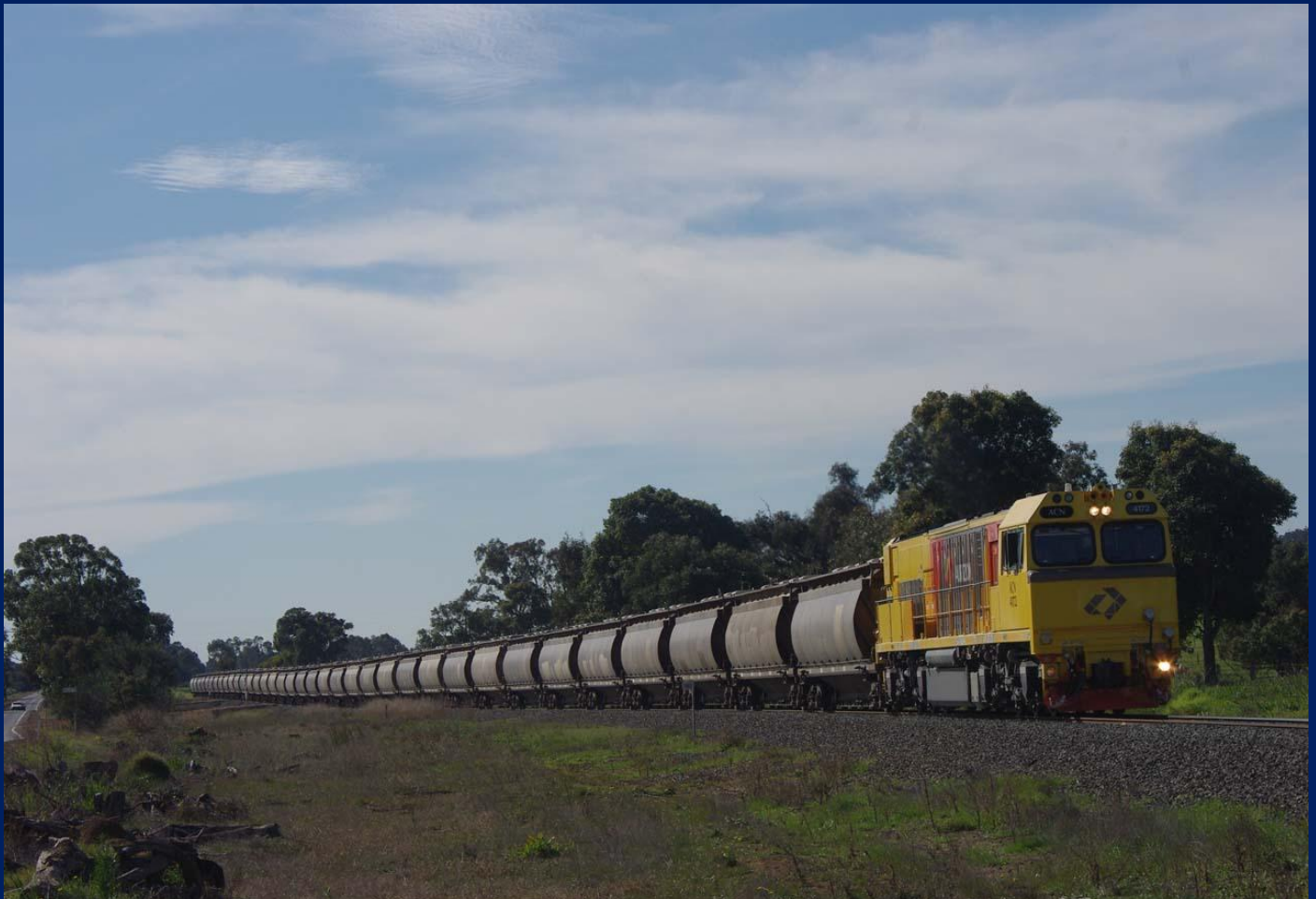
ACN4172 on 2873 alumina at Roelands July 8th.