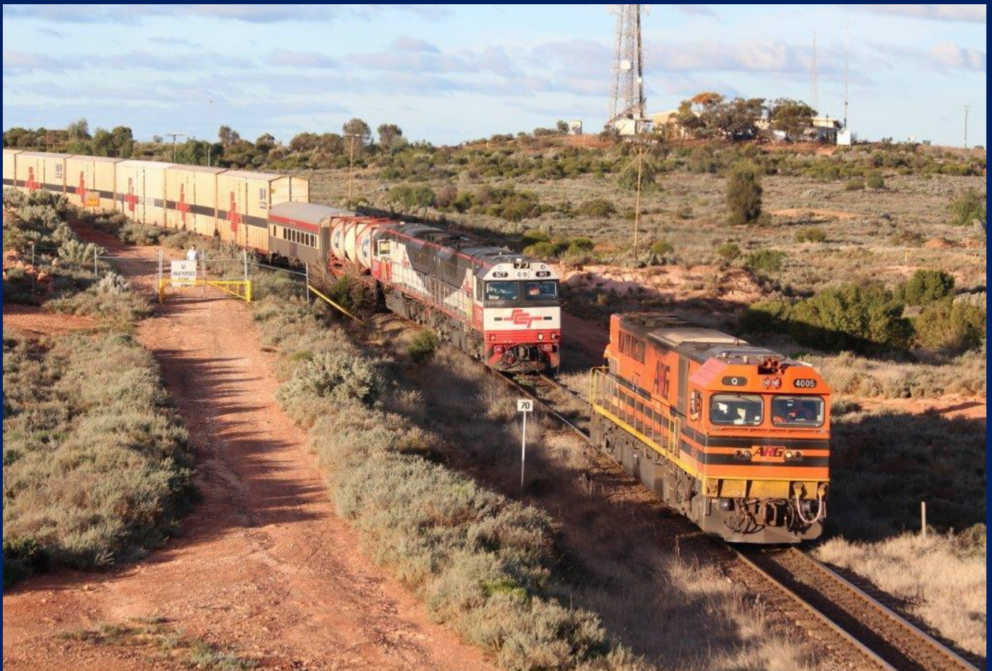
Relief engine Q4005 approaching failed 5MP9 SCT freight at edge of Brookfield territory in Kalgoorlie 13/7.