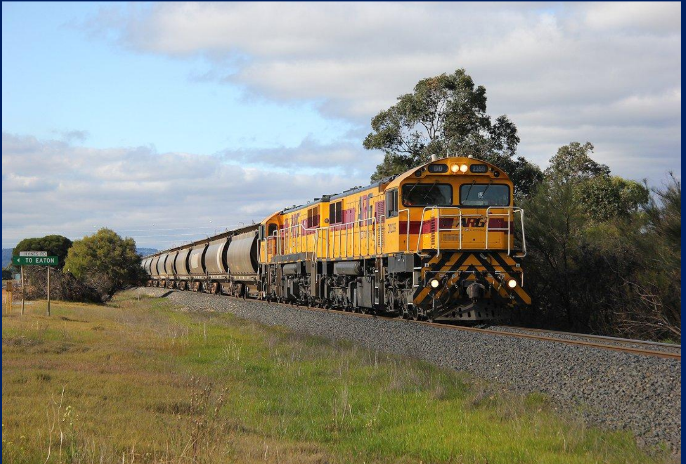
DD2358 & DD2359 on loaded alumina running thru Waterloo July 20th.