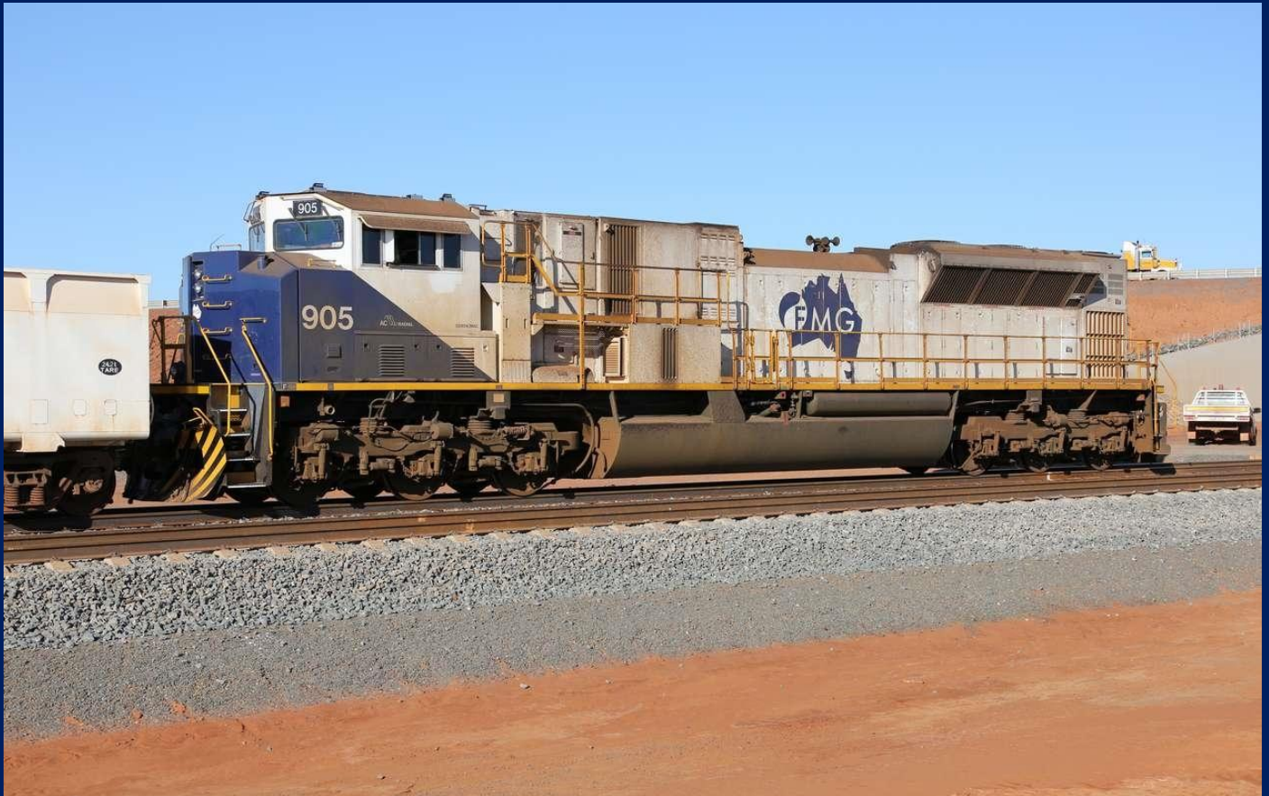
FMG SD9043MAC near Great Northern Highway overpass Port Hedland July 21st.