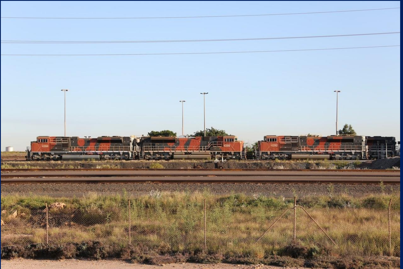
BHPBio SD70ACes 4384, 4386 and 4392 stabled outside service shed Port Hedland July 30th.