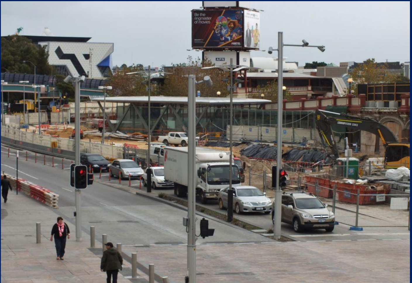
Work underway on underpass connecting Perth and underground station July 14th.