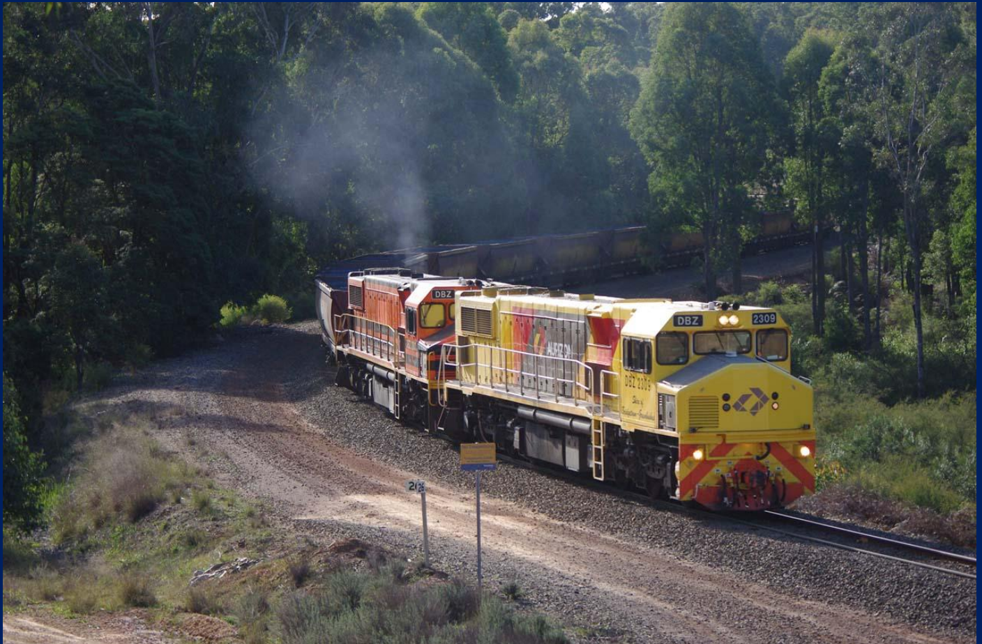
DBZ2309 & DBZ2303 on 2595 coal at Worsley July 8th.