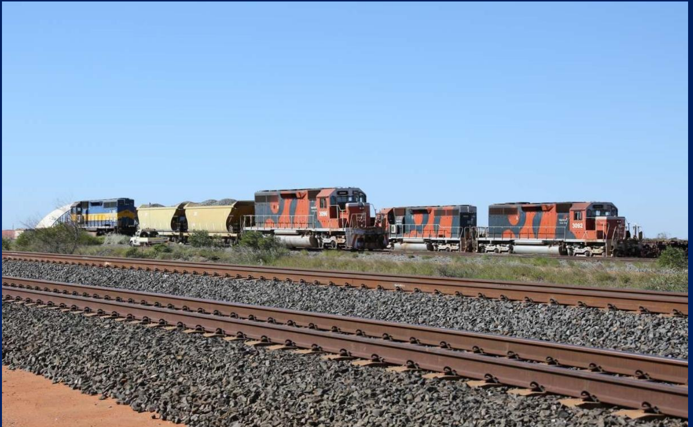
SD40R 3096 loaded ballast wagons 3078 on far track 3092 & 3093 flashbutt 20/7.