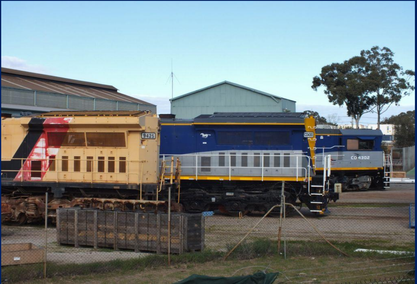
CFCLA CM40-8M ex Robe River 9425, CD4303 and CD4302 in UGL yard Bassendean 21/07.