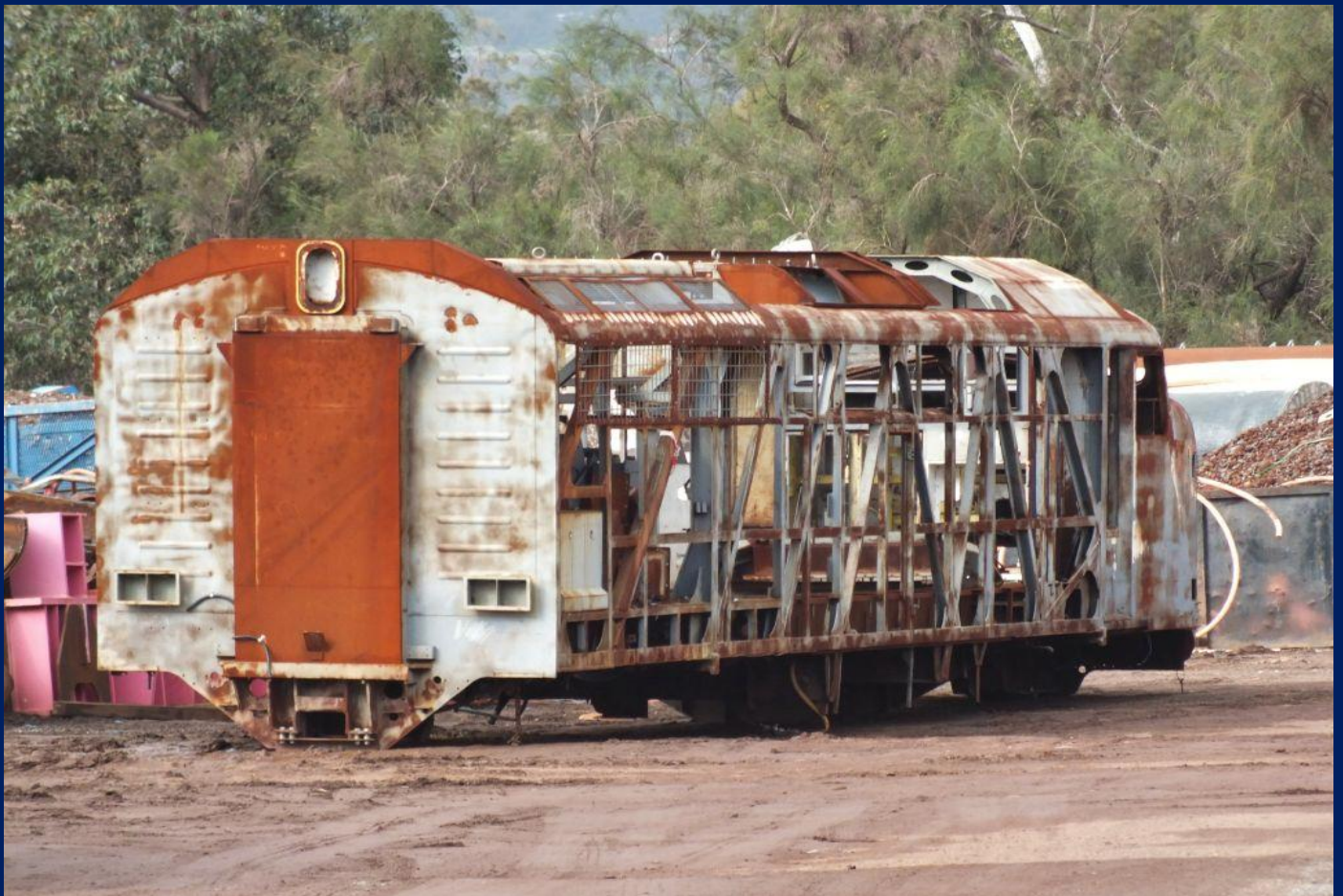
Shell of GM 30 in CD Dodd scrap yard awaiting scrapping July 30th.