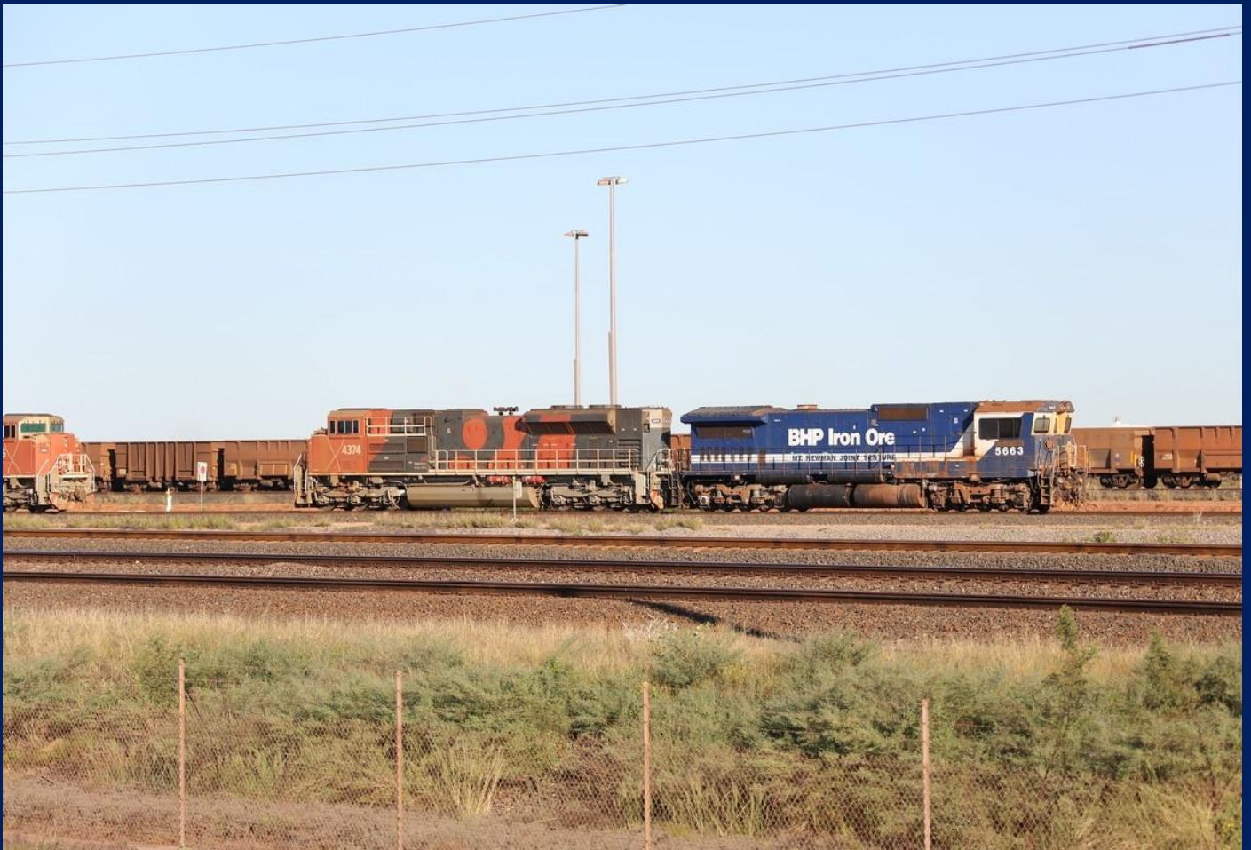
SD70ACe 4374 with CM40-8M 5663 in arrival roads Port Hedland July 30th.