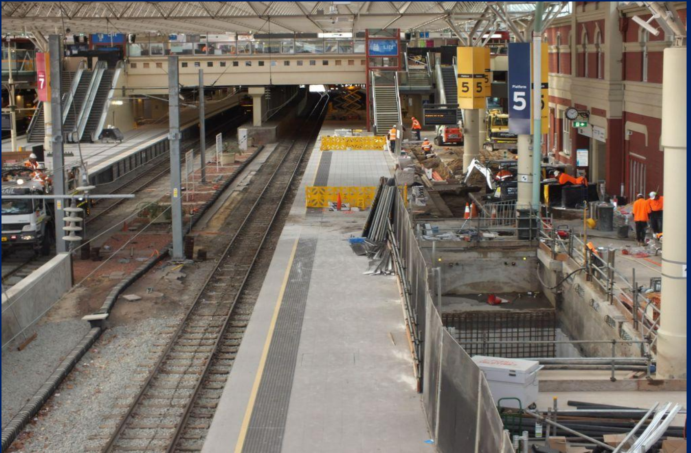
Perth Station was closed on weekend 12th 14th July here with work underway on platform 5.