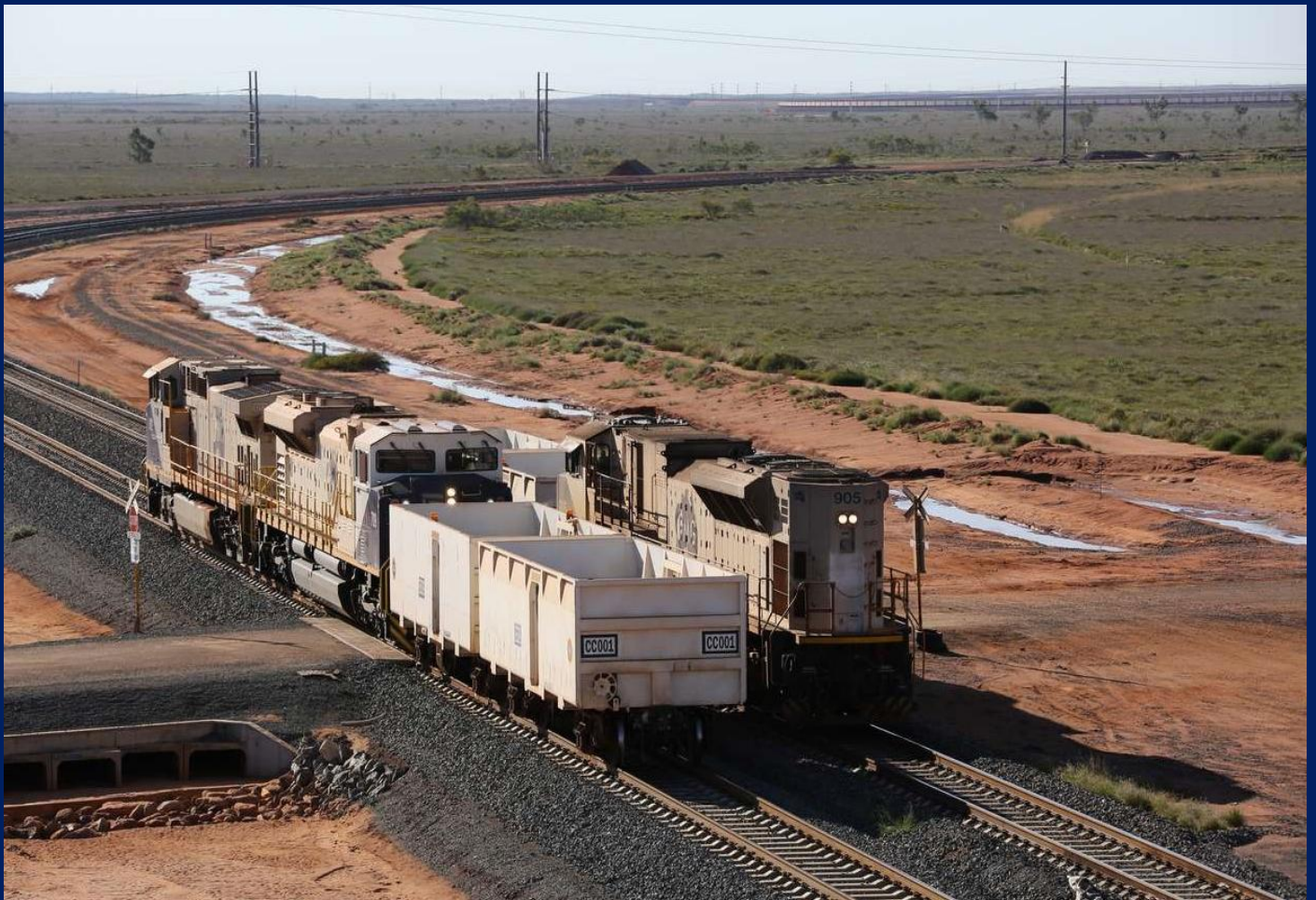
FMG CW44-9 012, SD70ACe 709 & SD9043MAC 905 at FMG port facility July 21st.