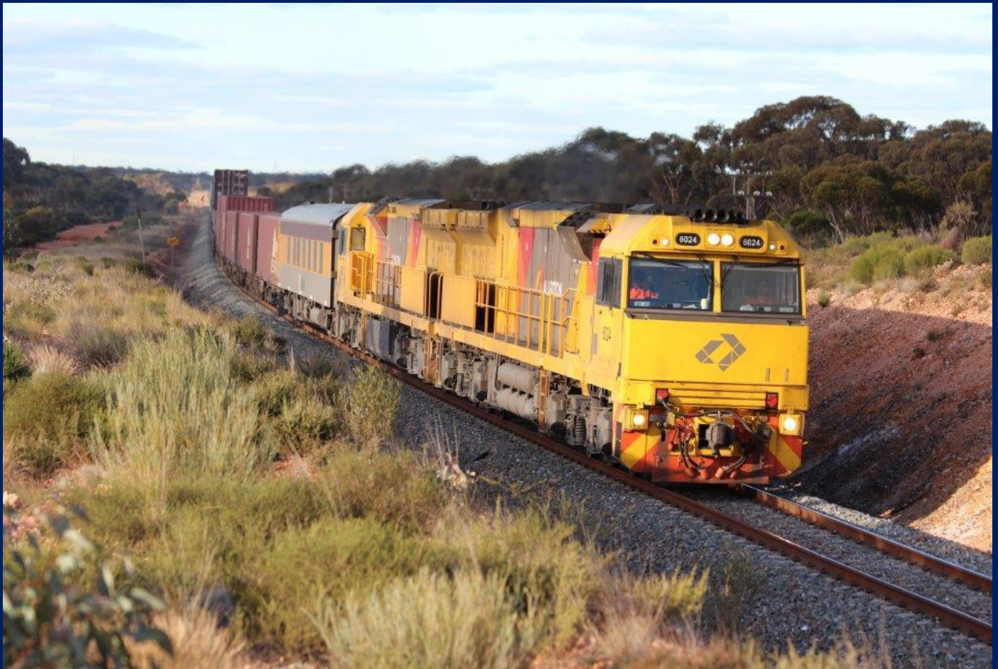
6024 & 6028 on 6MP1 Aurizon intermodal Binduli July 7th.