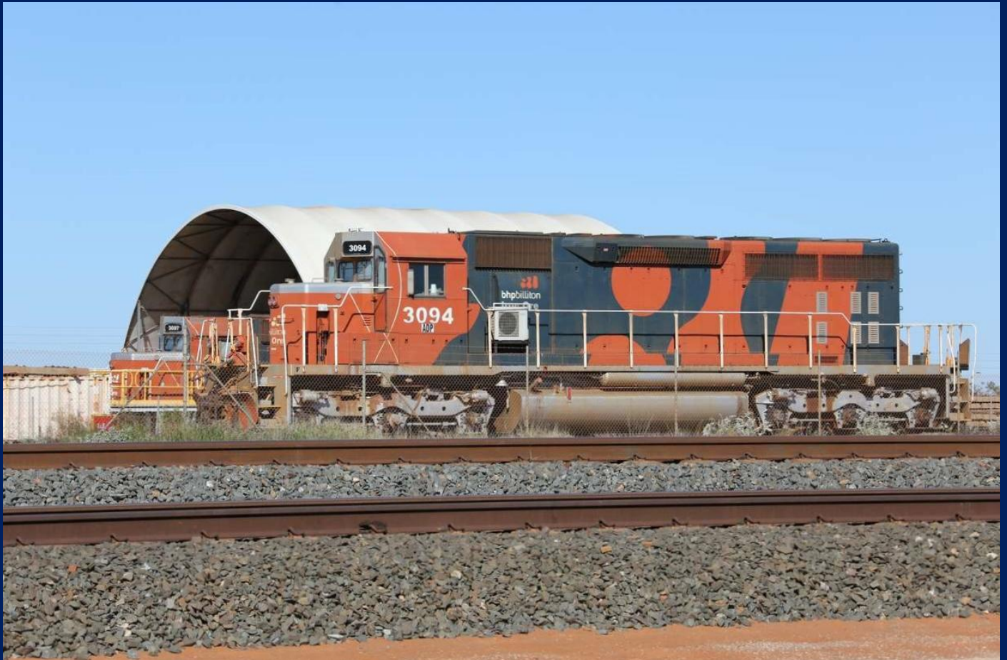
BHPBIO SD40R 3094 and 3097 in the shed at Bing flashbutt yard on July 20th.