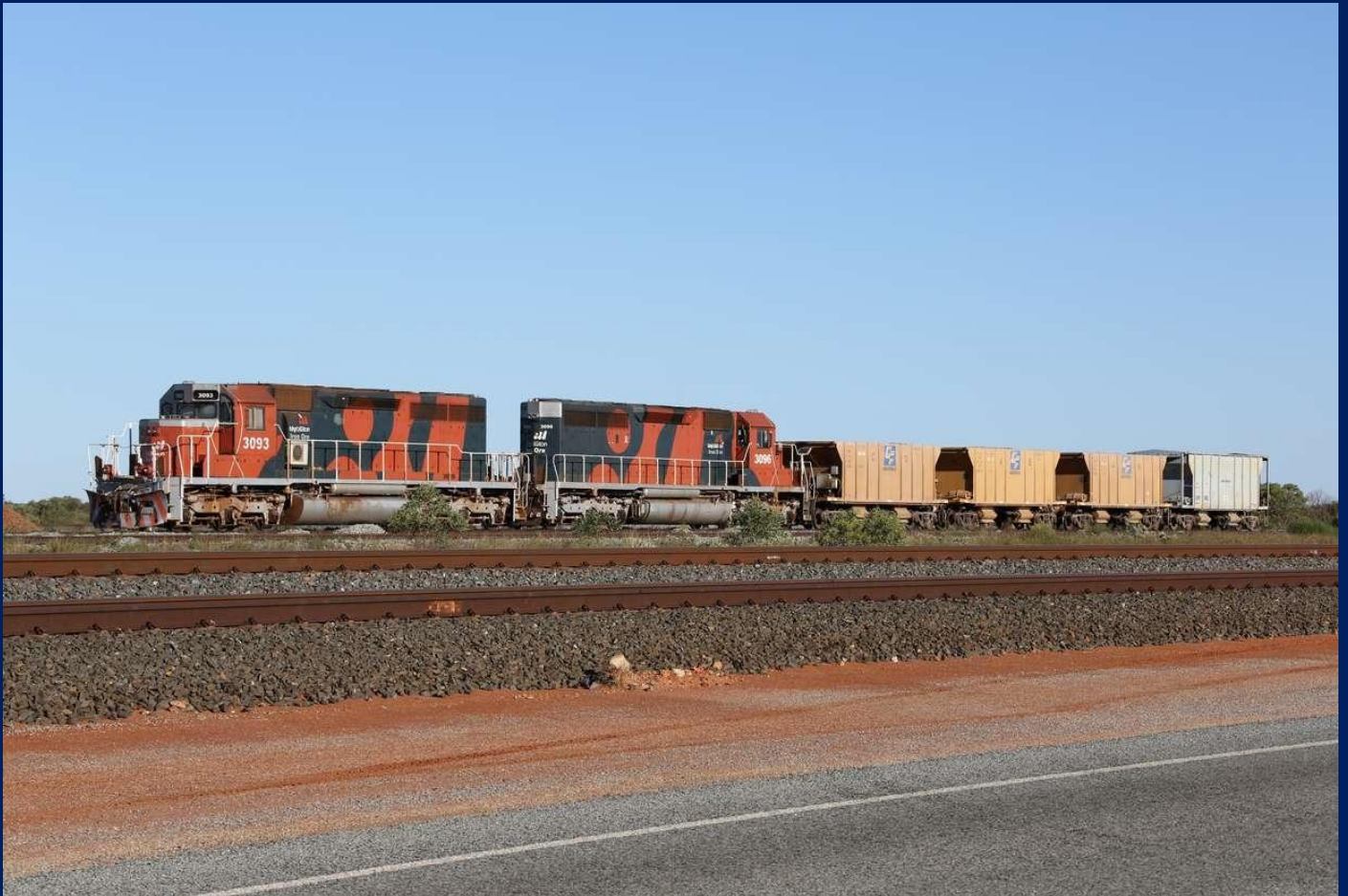
SD40R 3093 & 3096 stabled on ballast wagons at Bing flashbutt yard July 21st.