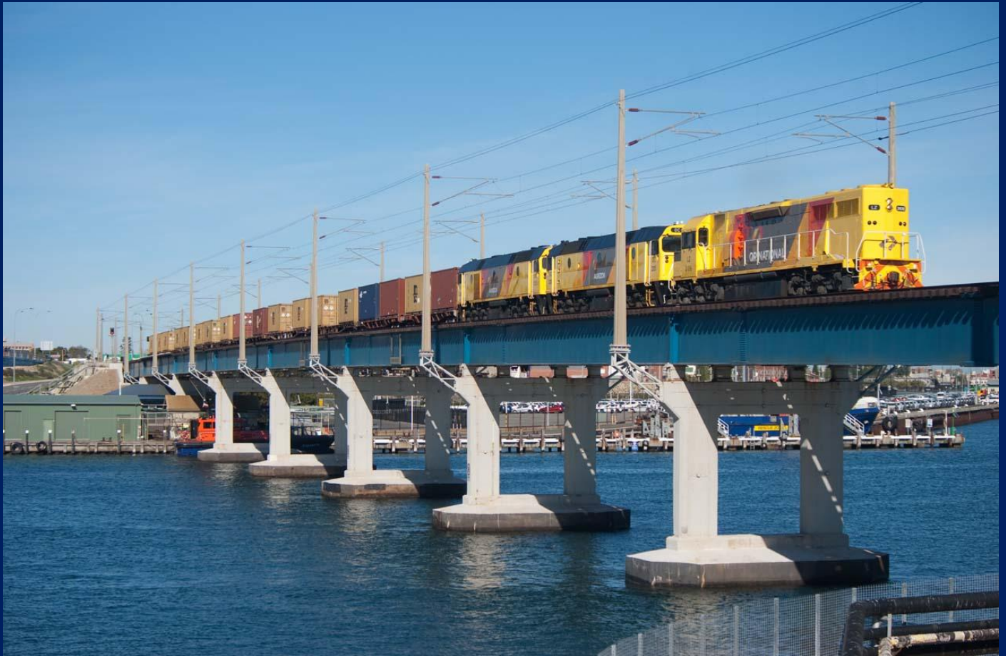
LZ3106, DC2205 & DC2213 on 2196 container train crossing the Swan River at Fremantle July 8th on only section of PTA track that sees regular freight movements.