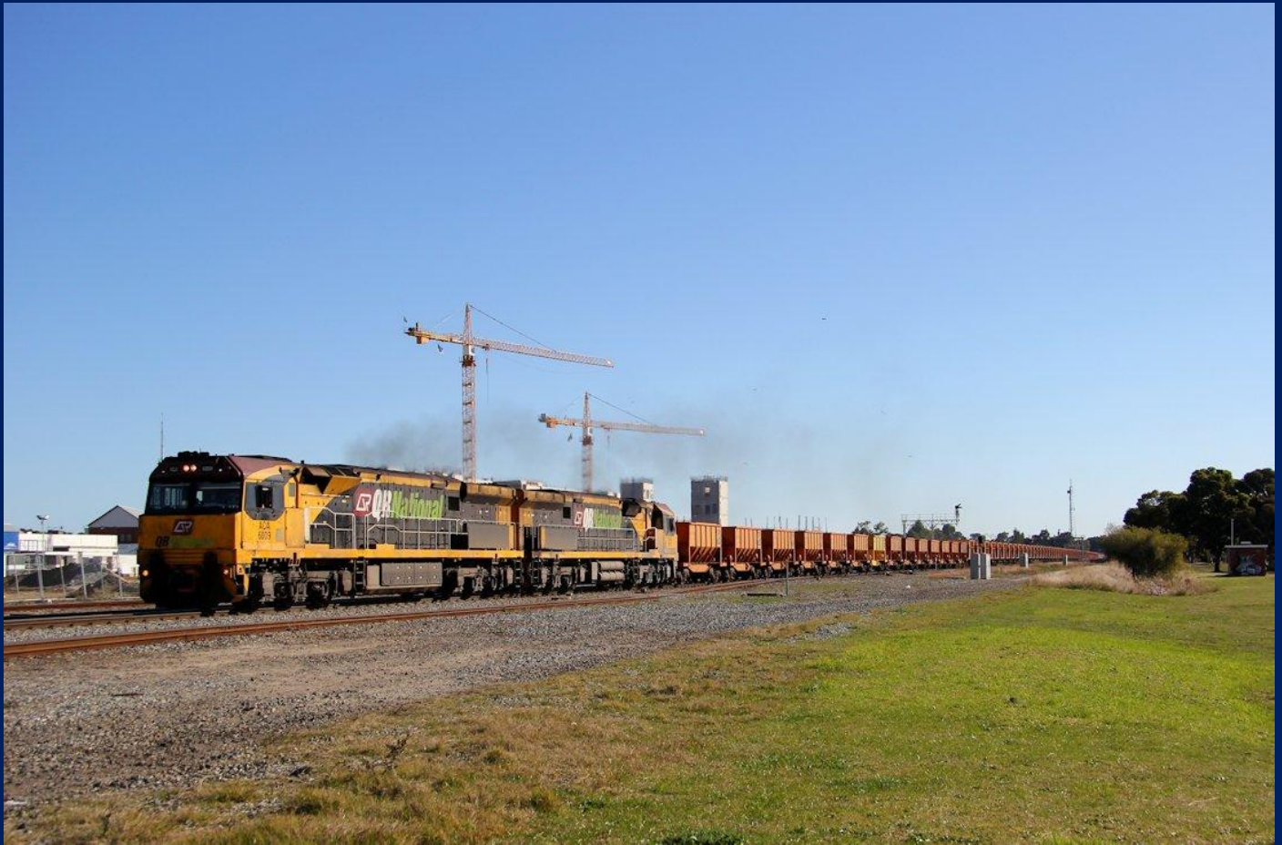
ACA6009 & ACA6012 on 7035 empty ore running thru Midland July 6th.