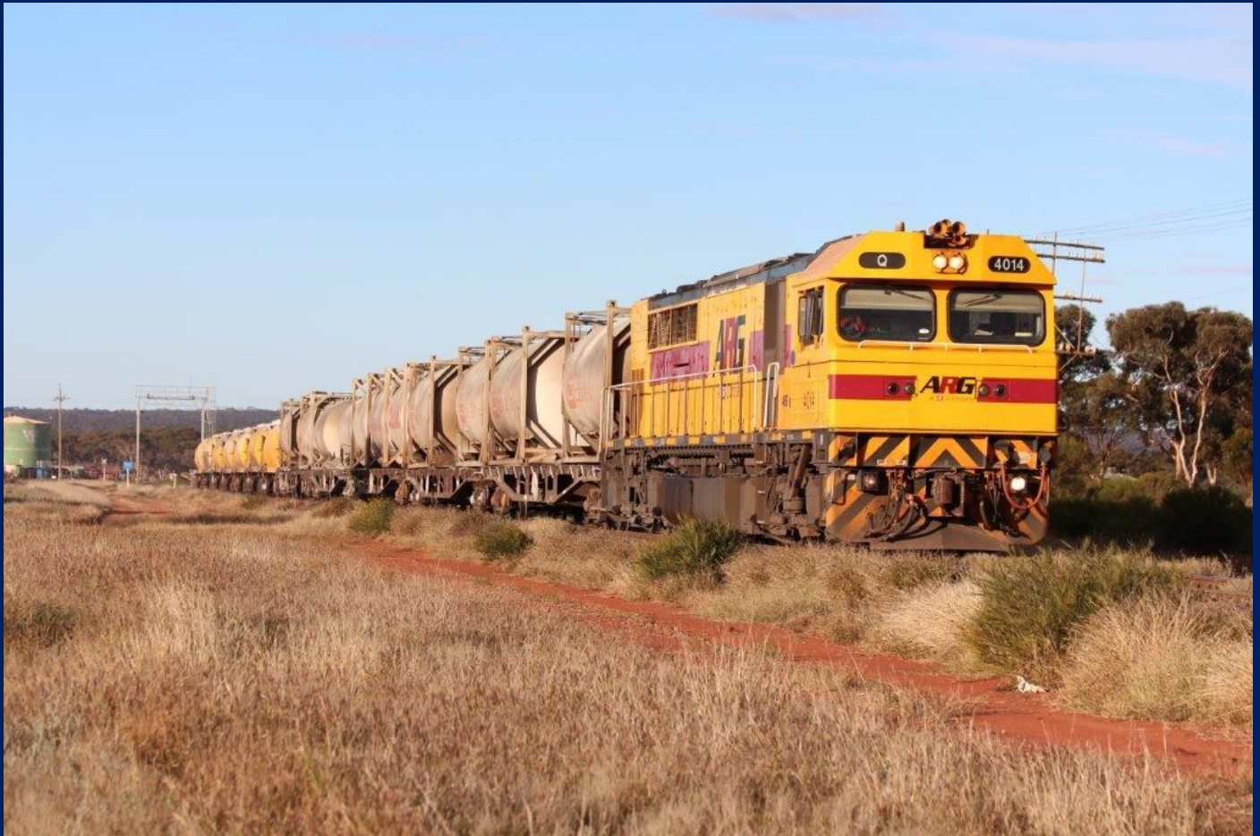
Q4014 on 7C74 lime shunter departing Parkeston for WEK July 6th.