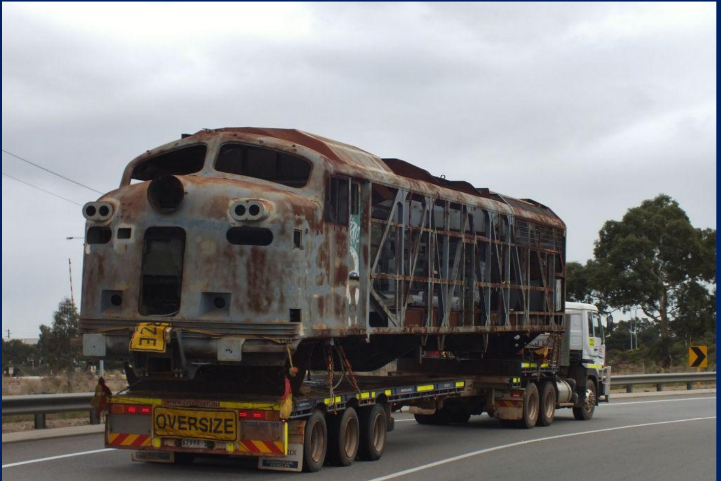
Shell of GM30 whose rebuild was cancelled being hauled to CD Dodd scrap yard in Forrestfield July 30th.