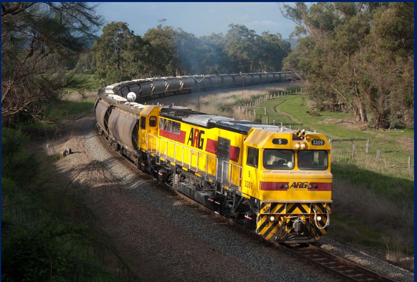
S3309 on 4875 loaded alumina at Pinjarra South July 10th.