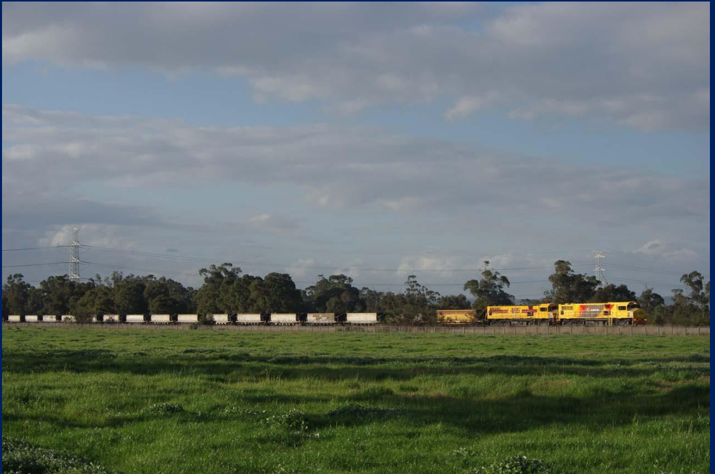
DBZ2309 & DBZ2307 on 4253 coal at Pinjarra South July 10th.