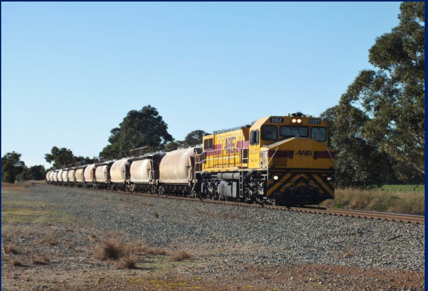
DBZ2307 runs 2271 lime from Cockburn Cement to Worley Alumina Hamilton at Keysbrook 1/7.