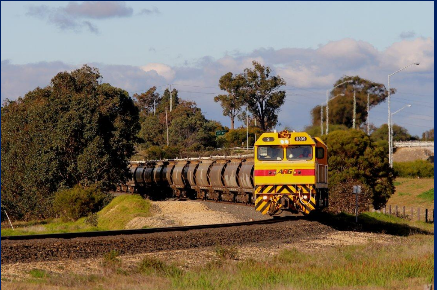
S3309 on loaded alumina to port at Bunbury suburb of Vittoria July 20th.