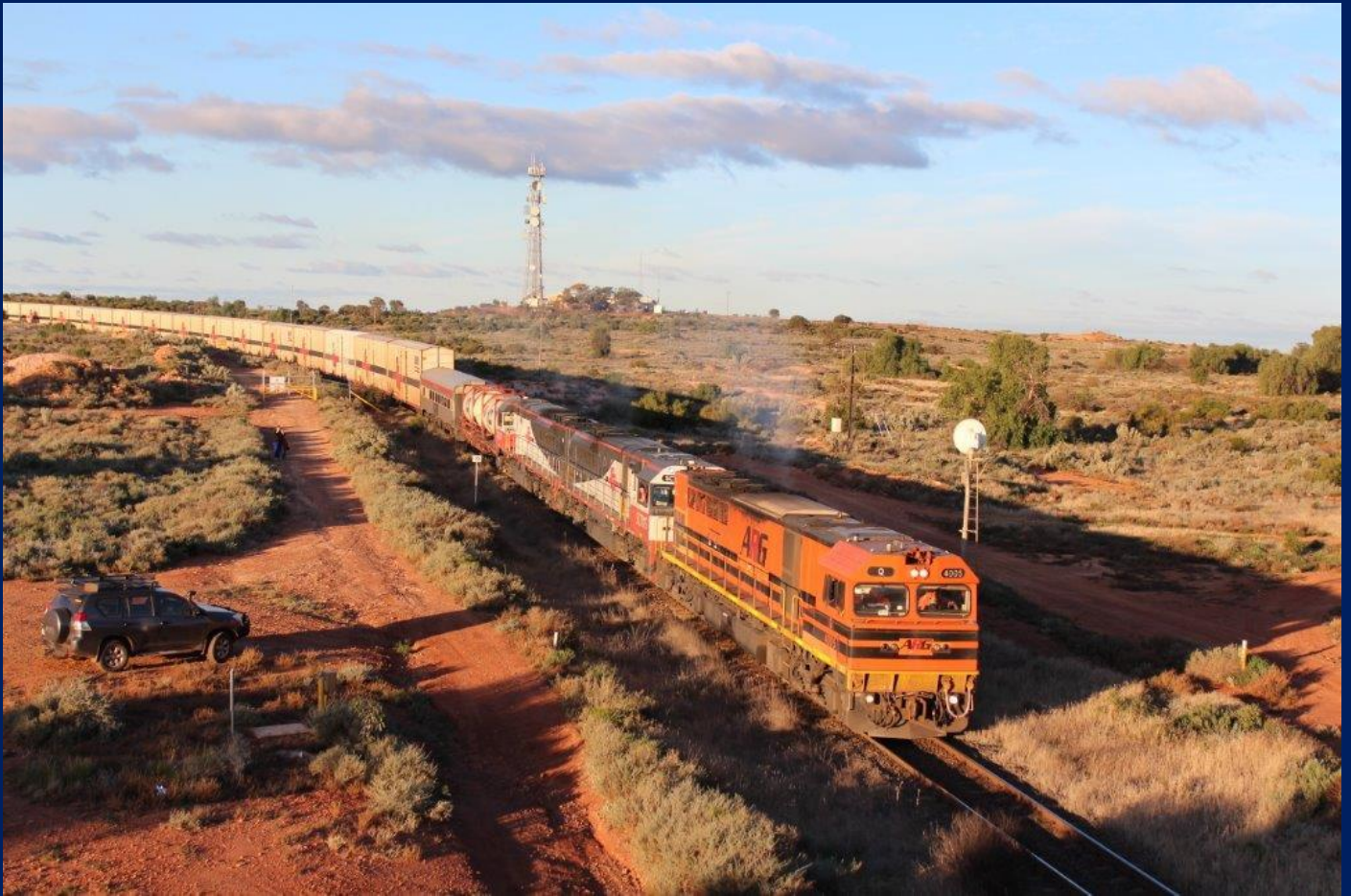
Relief engine Q4005 commencing to haul SCT 5MP9 towards West Kalgoorlie July 13th.