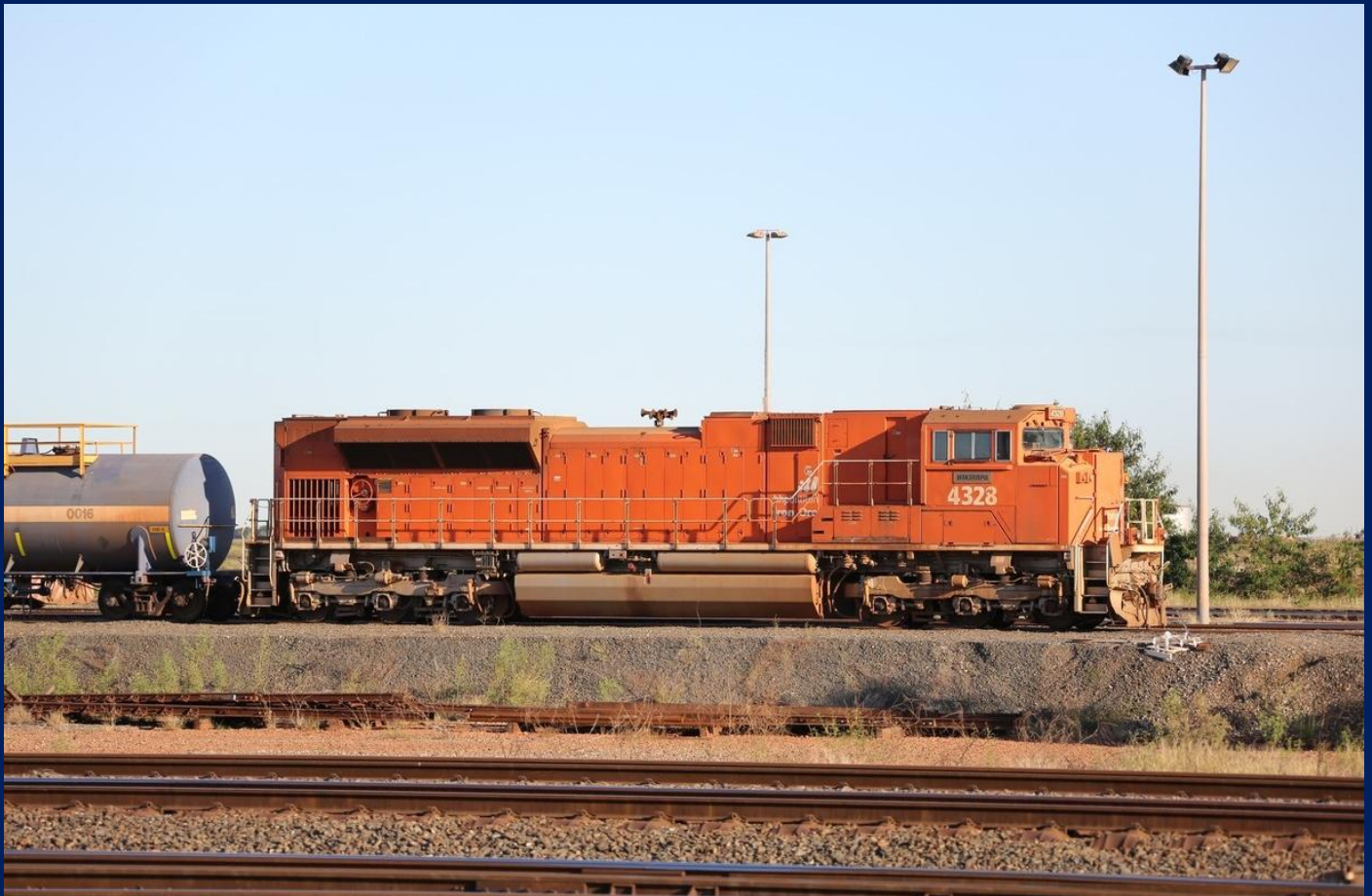
BHPBIO SD70ACe 4328 one of an order for BNSF that was diverted to BHPBIO as urgently needed motive power in 2011, sits on fuel train at Port Hedland July 30th.