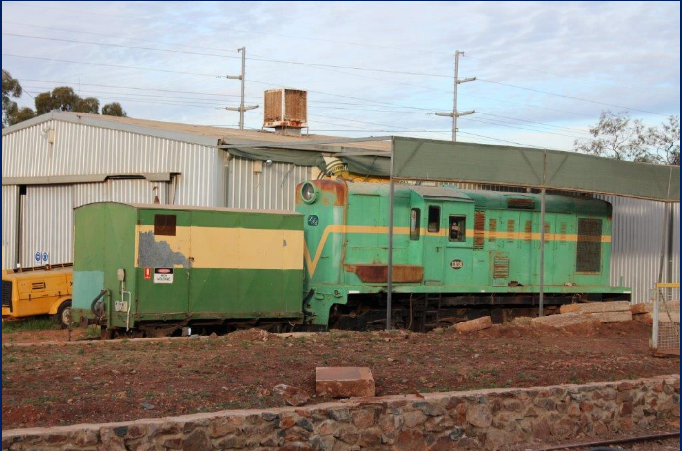
Y1108 and power van at Boulder Loop Line Yard at old Boulder Station July 6th.