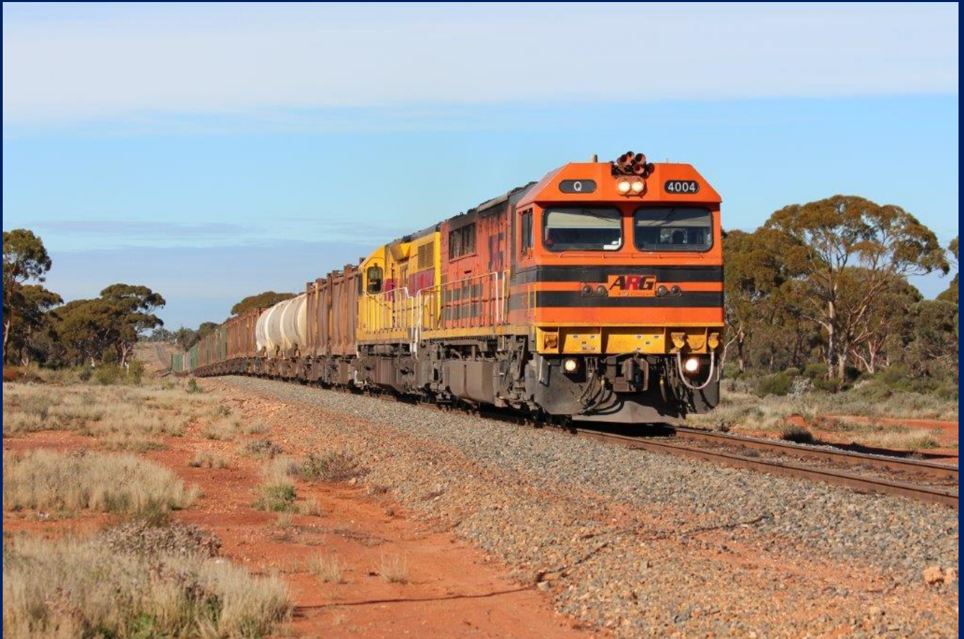
Q4004 & LZ3112 run late 6029 sulphur out of Kalgoorlie on Leonora line July 6th.