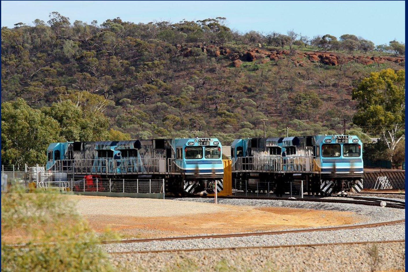
CBH007, CBH008, CBH009 & CBH003 at Watco service facility Mingenew July 6th.