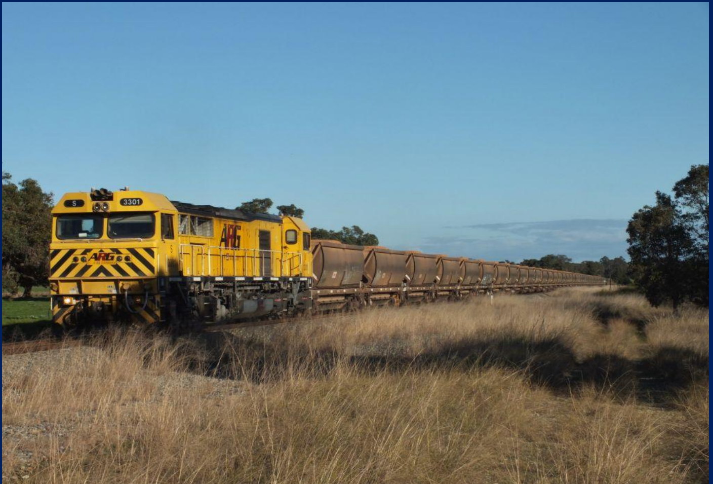
S3301 runs 2944 bauxite out of Keysbrook on way to Kwinana Refinery July 1st.