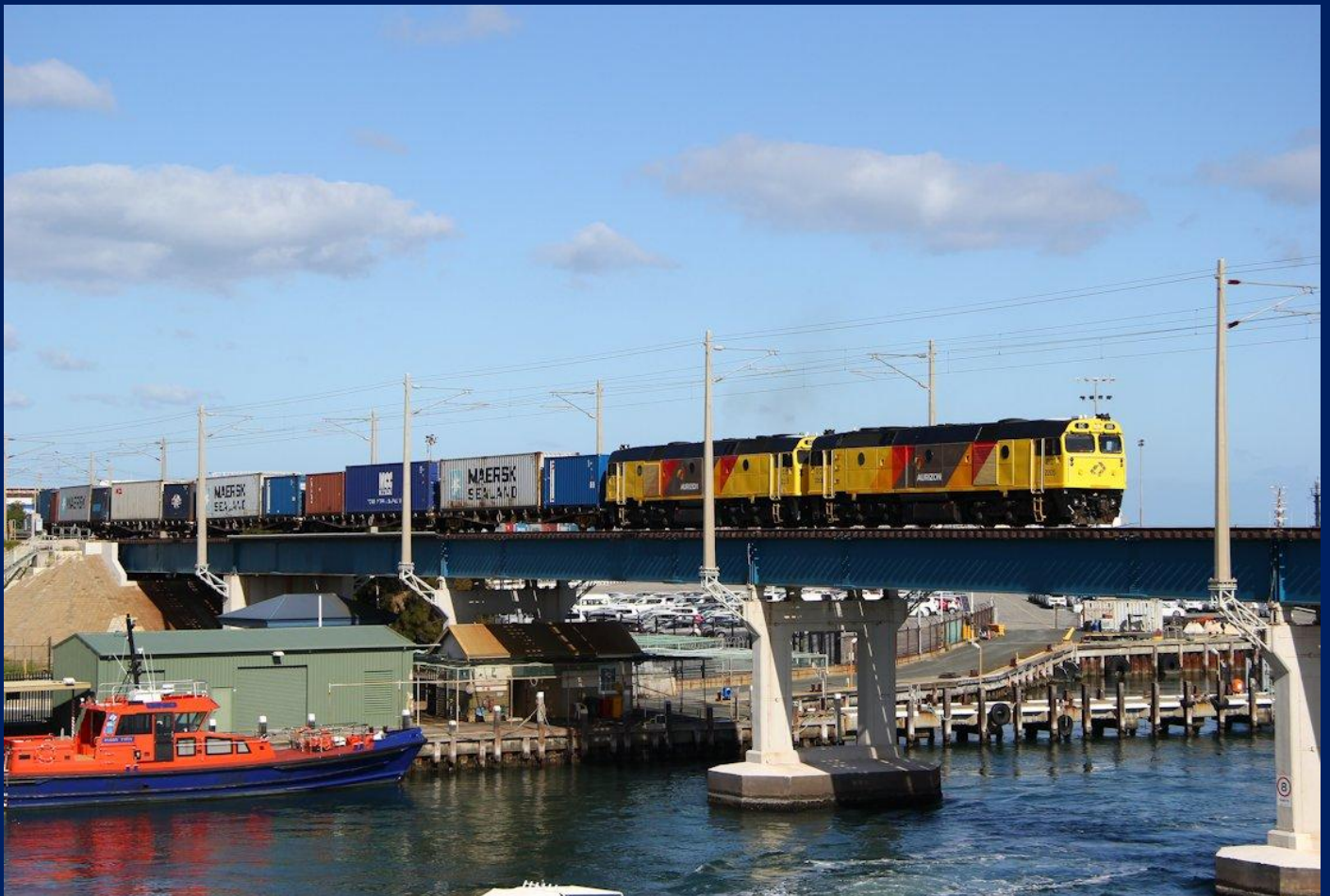
DC2205 & DC2213 on 6142 container train crossing Swan River Fremantle 19/7.