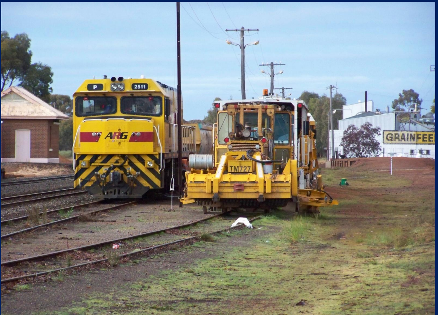
P2511 on ballast train with track machines stabled in cripple road at Wagin 19/7.