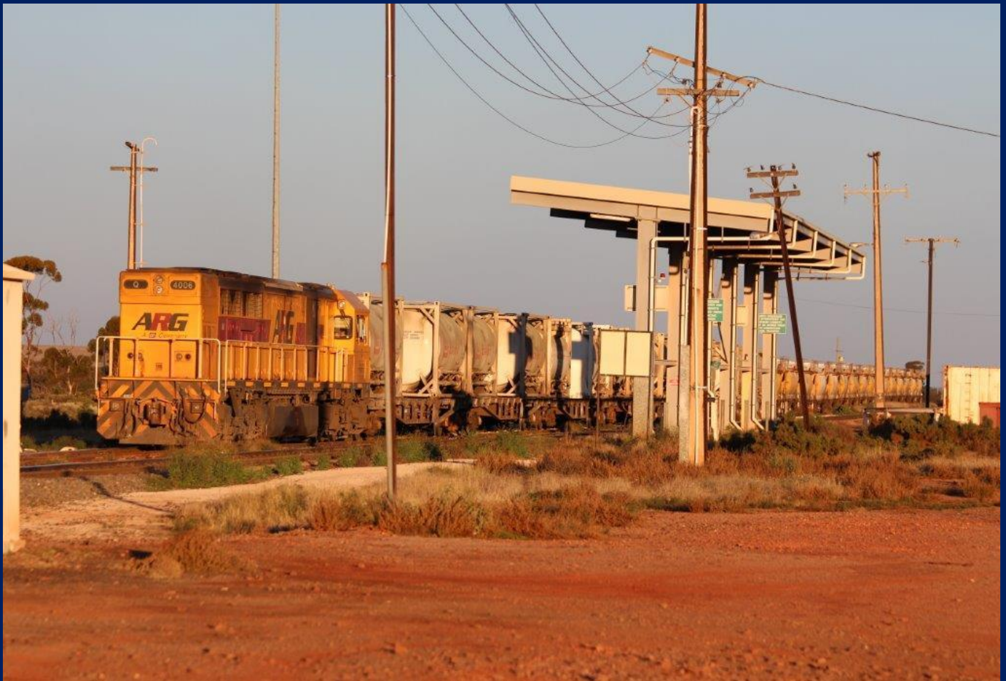
Q4006 on 1C74 super sized Parkeston shunter in loop July 14th, as didn't run on 13th.