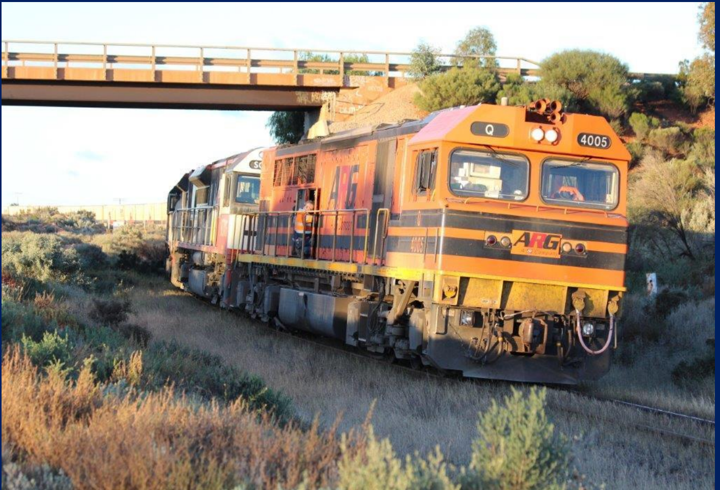
Q4005 then suffered computer problems in an effort to fix the problem Q4005 was shut down.