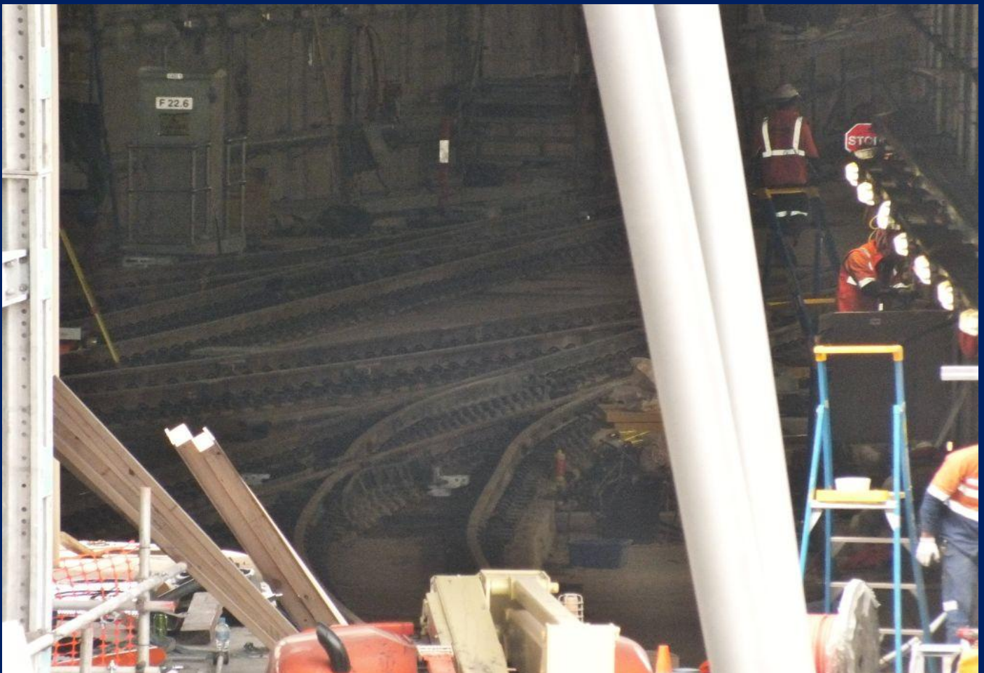
Work being undertaken in the Fremantle line tunnel July 14th prior to opening.