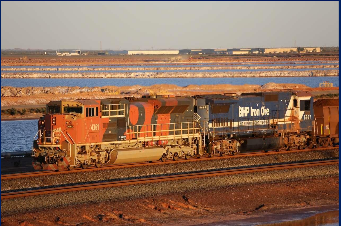
SD70ACe 4361 & CM40-8M 5667 haul loaded ore past salt settling ponds 21/7.