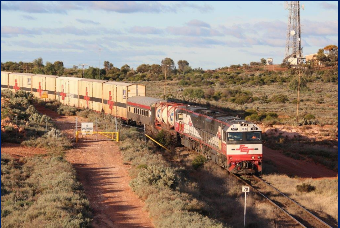
SCT015 & SCT007 on 5MP9 failed July 13th climbing Parkeston bank, now waiting relief Aurizon locomotive.