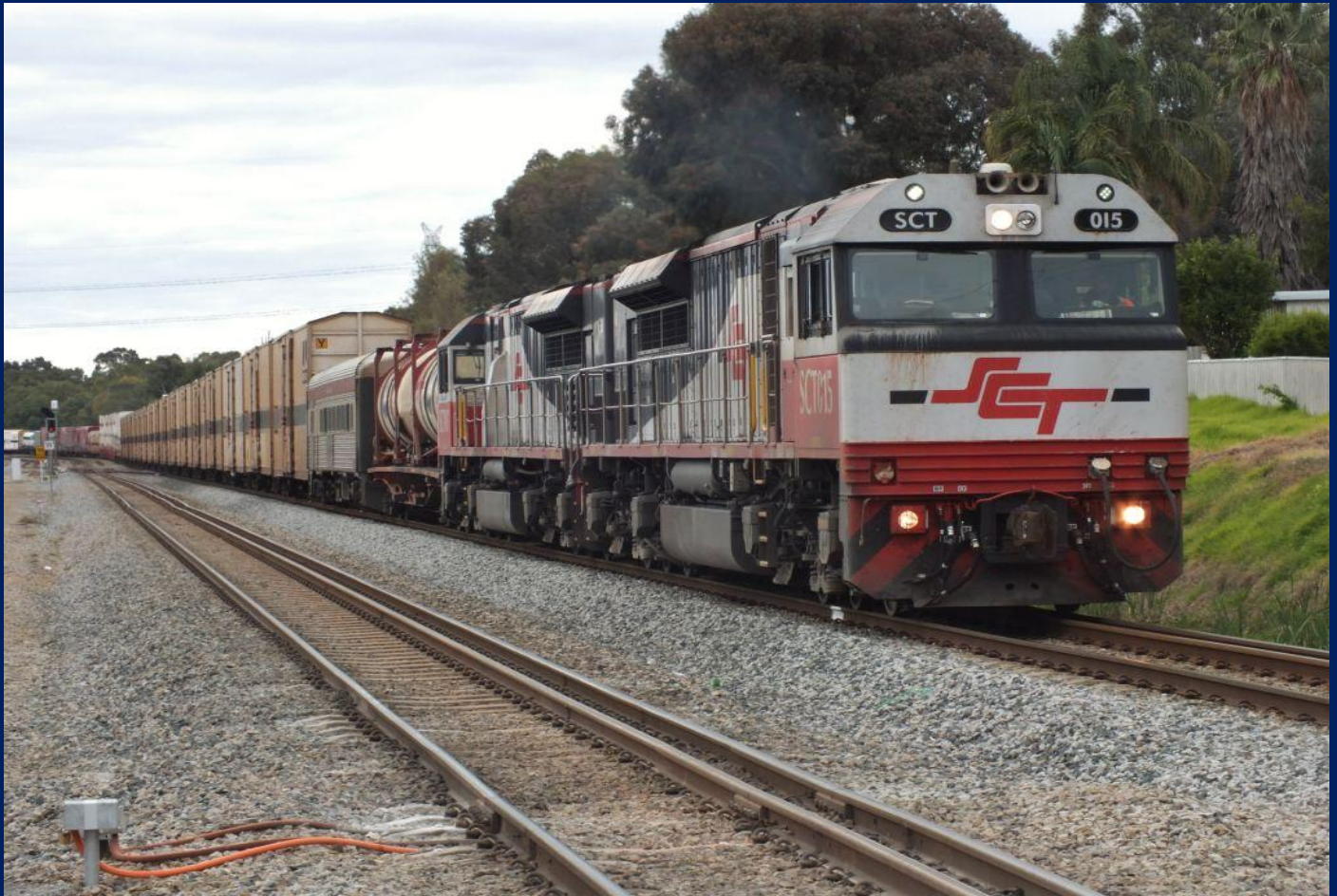
Failed SCT015 with only SCT007 working hauls very late 5MP9 thru Hazelmere July 14th.