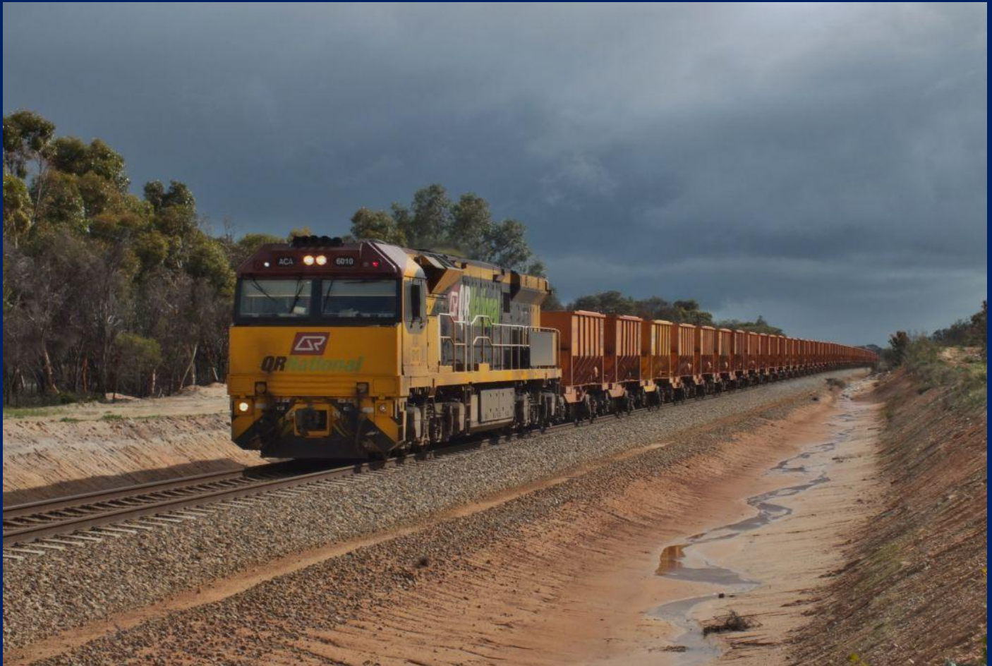
ACA6010 runs 5033 empty ore to Mt Walton thru Meenaar east Northam 15/8.