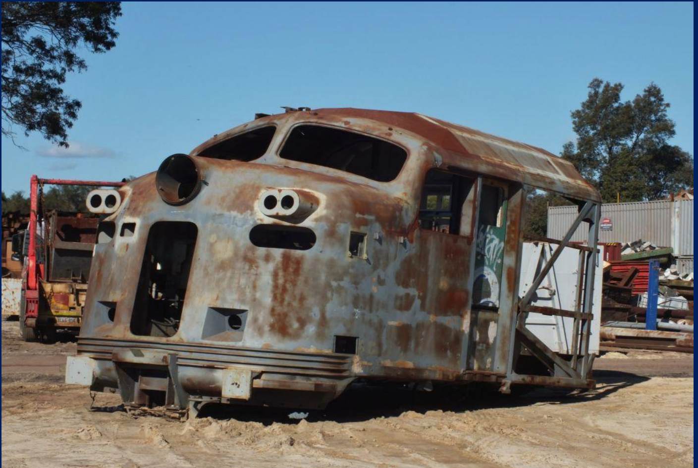
Cab of GM30 in D C Dodd scrap yard Forrestfield cab has been sold for preservation 3/8.