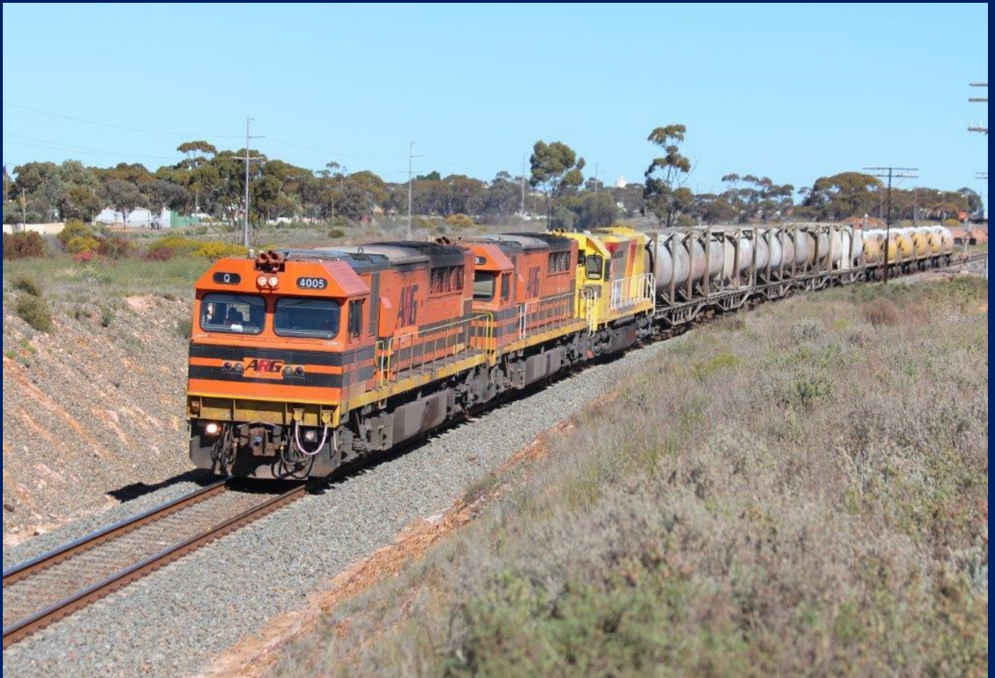
Q4005, Q4001 & LZ3106 on 7C71 Parkeston shunter at West Kalgoorlie August 24th.