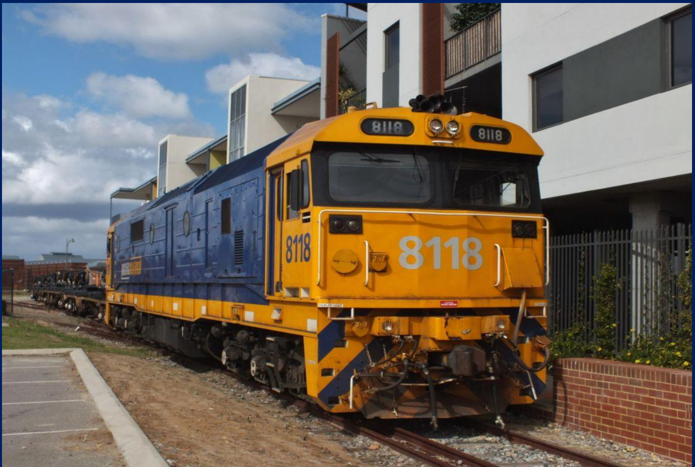
8118 propels wagons of bogies for EMU set 095 into old workshop yard 16/8.