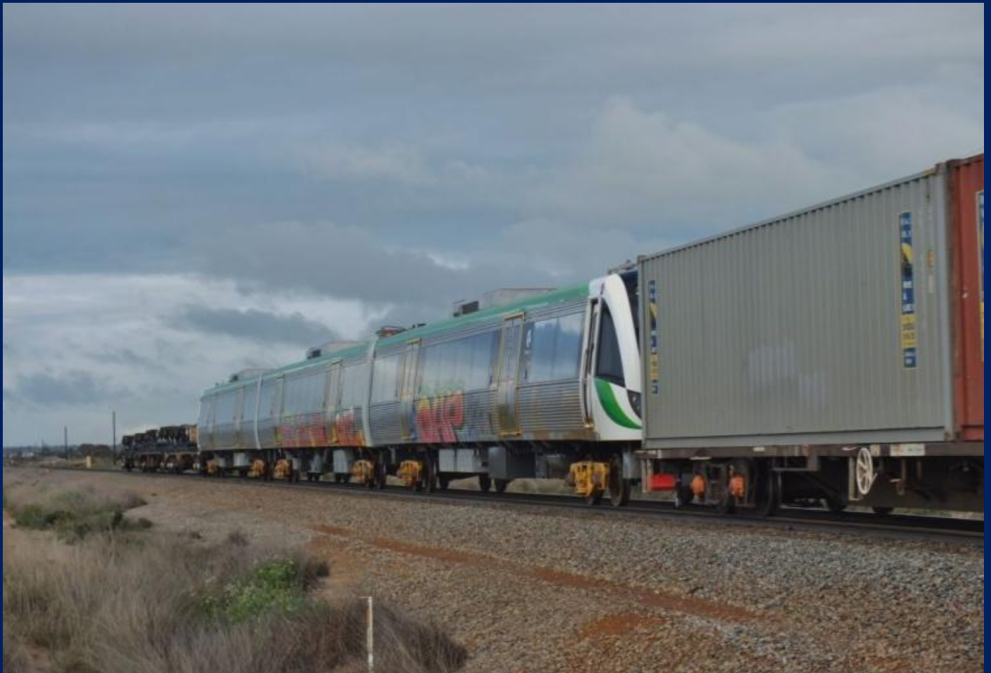
EMU set 095 on rear 2NP3 steel train at Wyola West August 15th.