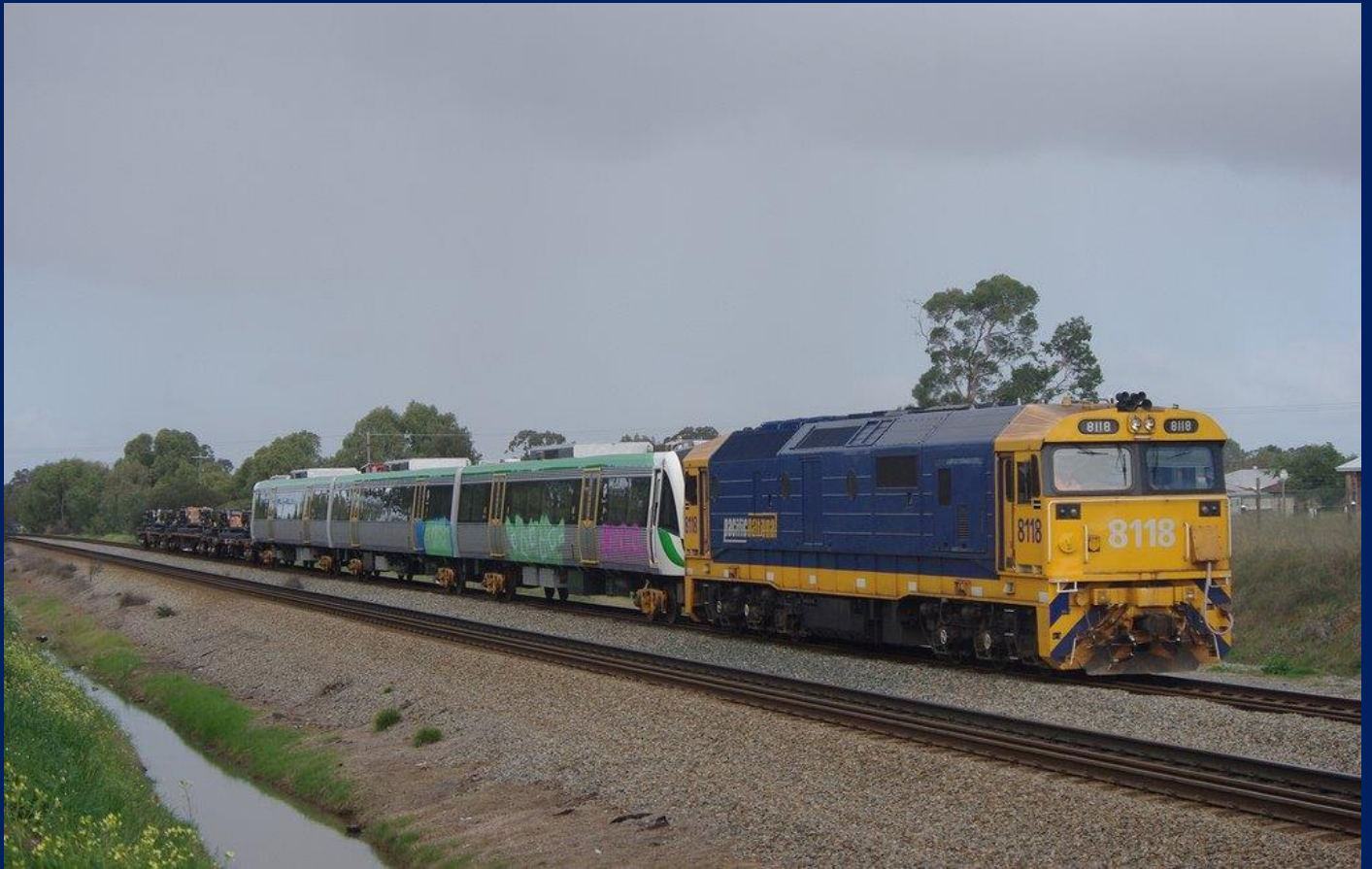
8118 on 6P31 empty railcar movement at Hazelmere August 16th.