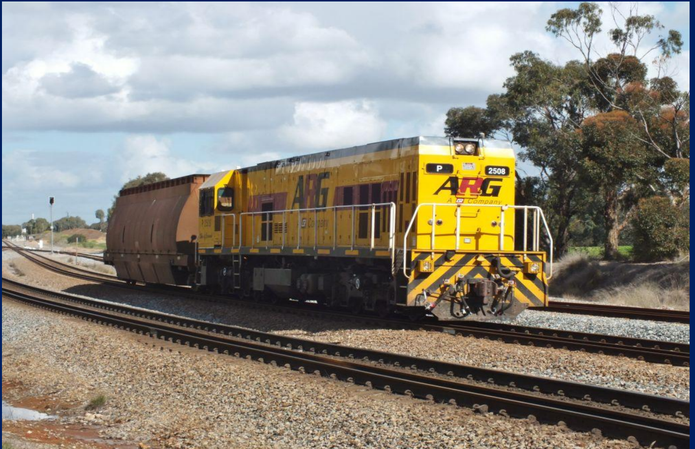
P2508 runs 5283 empty wagon transfer Forrestfield to Avon Yard at Woodbridge 1/8.