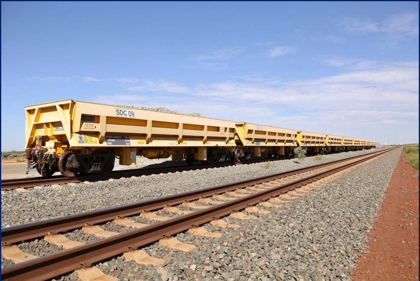
Rake of FMG side dump cars stabled in Barker Siding ballast road August 15th.