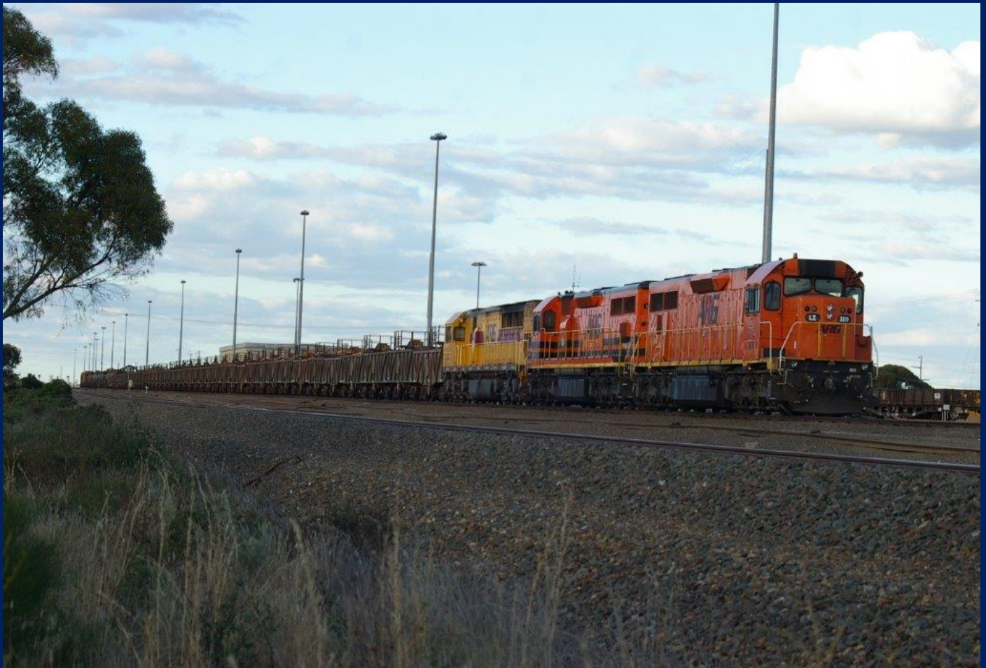
LZ3119, LZ3117 & Q4006 on 2443 Esperance freight, AOPY ore cars and tankers 5/8.