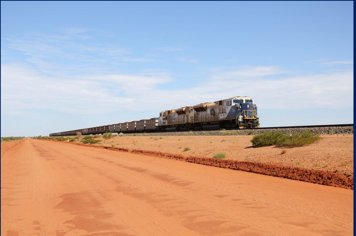
FMG 704 & 710 on short ore running north on Indee Station 15/8 after crossing from west to east track.