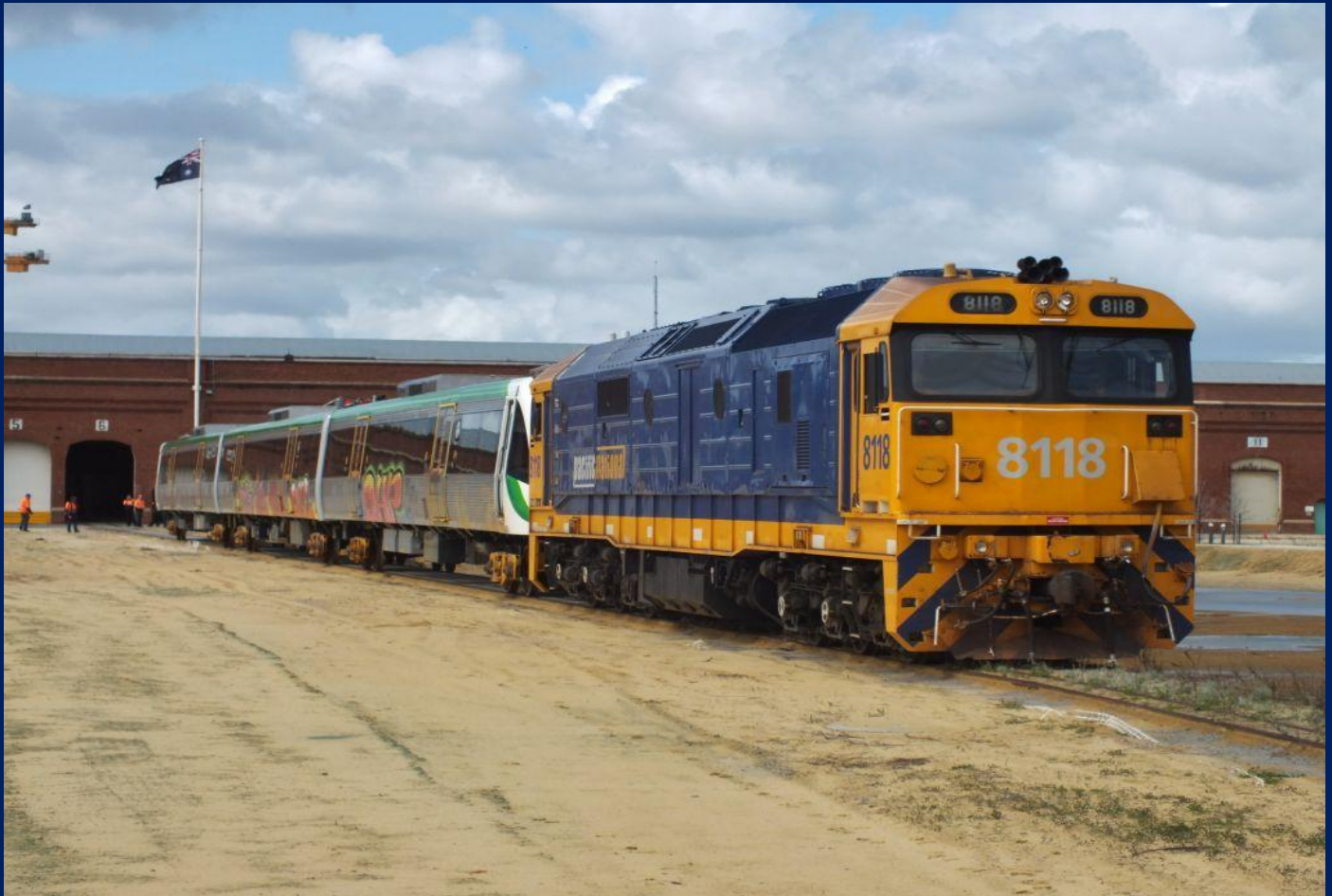
8118 propelling EMU set 095 into 6 road old workshops last one connected 16/8.