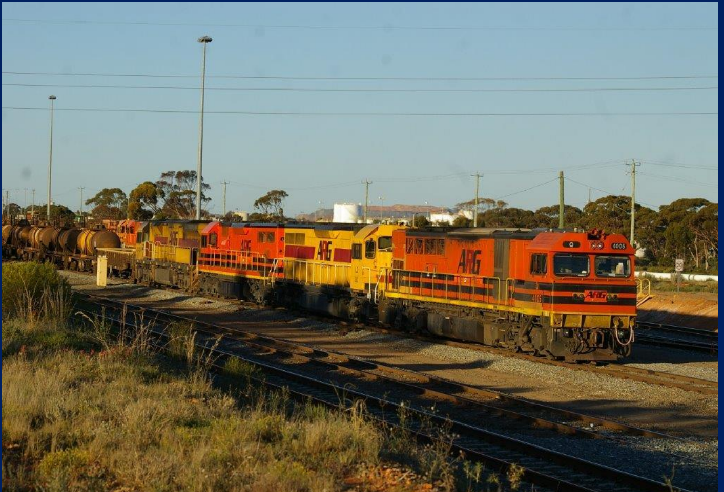
Q4009, LZ3112. LZ3117 dead attached AC4304 on 4426 freight to Forrestfield 14/8.