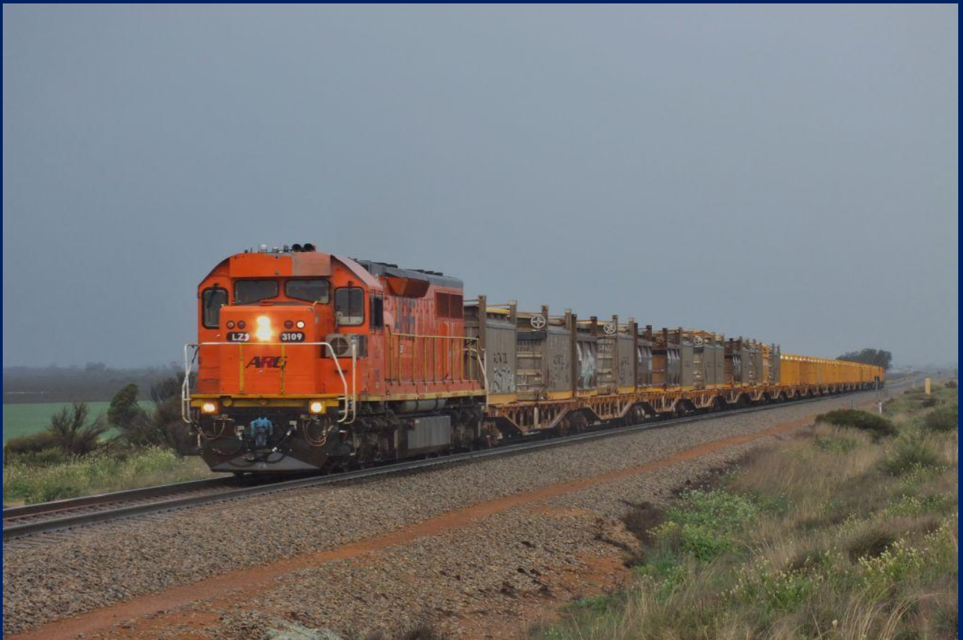
LZ3109 on 5474 run thru Wyola West east of Cunderdin in rain August 15th.