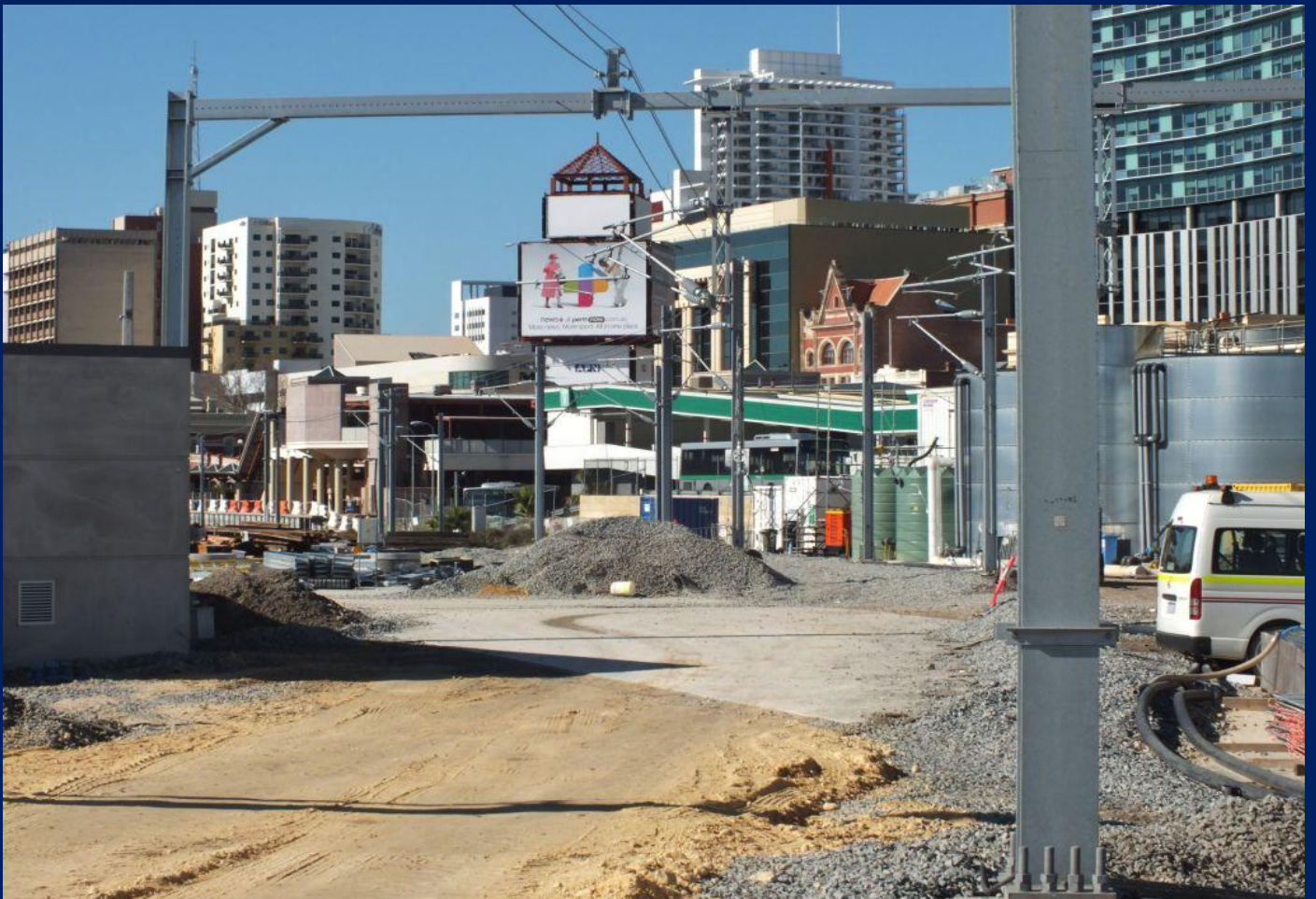
Old Fremantle line alignment looking back toward old platform 11 and bus station 4/8.