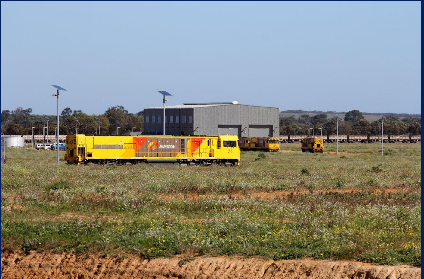
ACN4171 turns on triangle at Narngulu East with further ACNs stabled August 3rd.