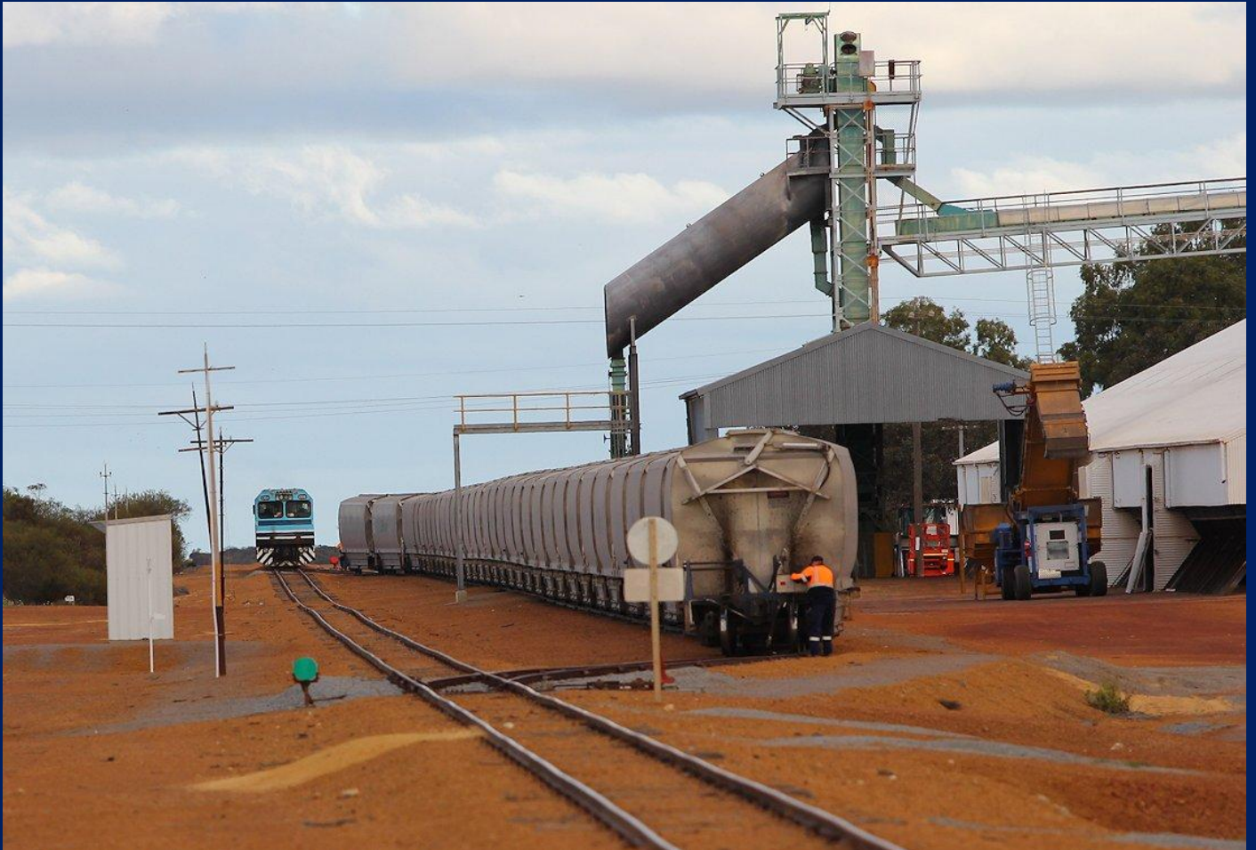
CBH008 & CBH007 run round at end of Tier3 line at Maya on Watcos first run there 10/8.