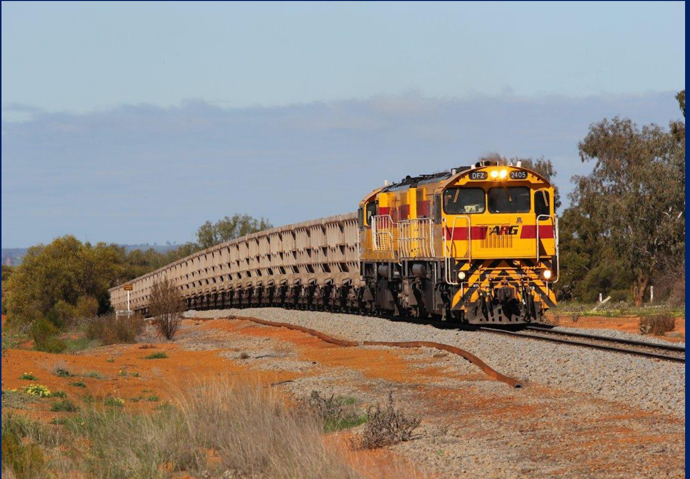
DFZ2403 & DFZ2401 on loaded Karara Mining ore from Perenjori out of Morawa 10/8.

The first cars of an order of 24 new three car EMU sets, 095 were completed and hauled by rail from Maryborough Queensland to Perth Freight Terminal Kewdale then onto old workshops Midland where they were bogie exchanged and placed on their powered bogies. Watco ran to end of only Midwest tier3 grain line south of Perenjori to empty the CBH grain bins at Maya. Second shutdown of Fremantle line to allow further work on sinking the line and upgrading Perth Station took place on first four days of the month. Operation on AOPY cut down former Leigh Creek coal wagons continued with a dedicated 42 wagon fleet hauled by two L class units operating to and from Esperance.