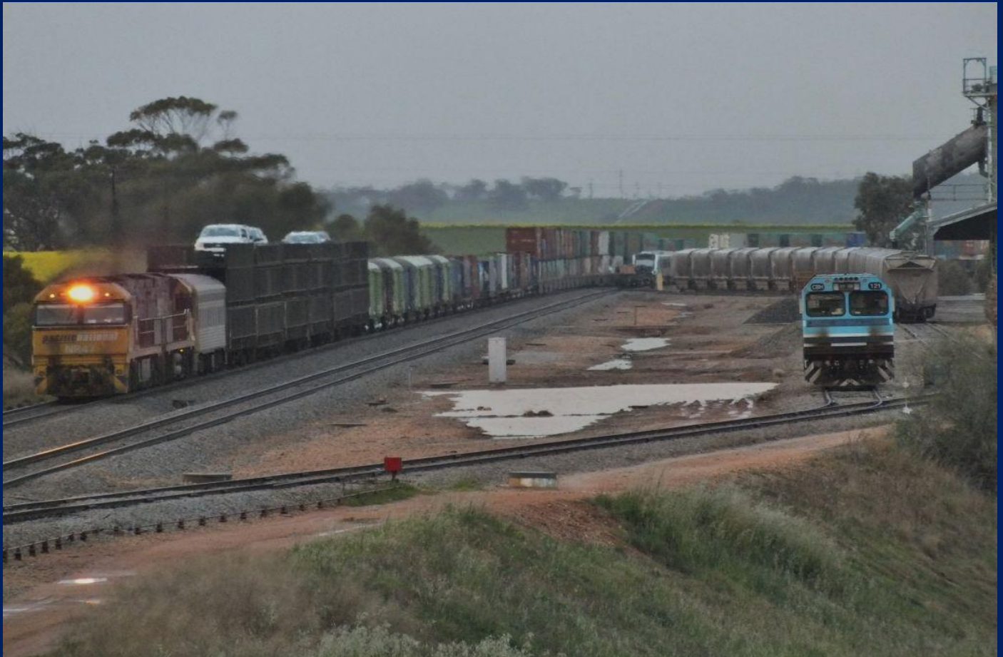
NR47 & NR.. on 5PM5 crosses 2NP3 in loop Grass Valley with CBH121 stabled 15/8.