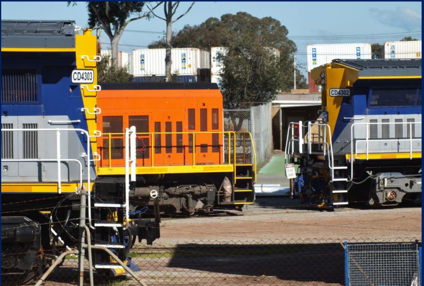
Long ends of CD4303, CD4302 and P2516 stabled at UGL Bassendean August 4th.