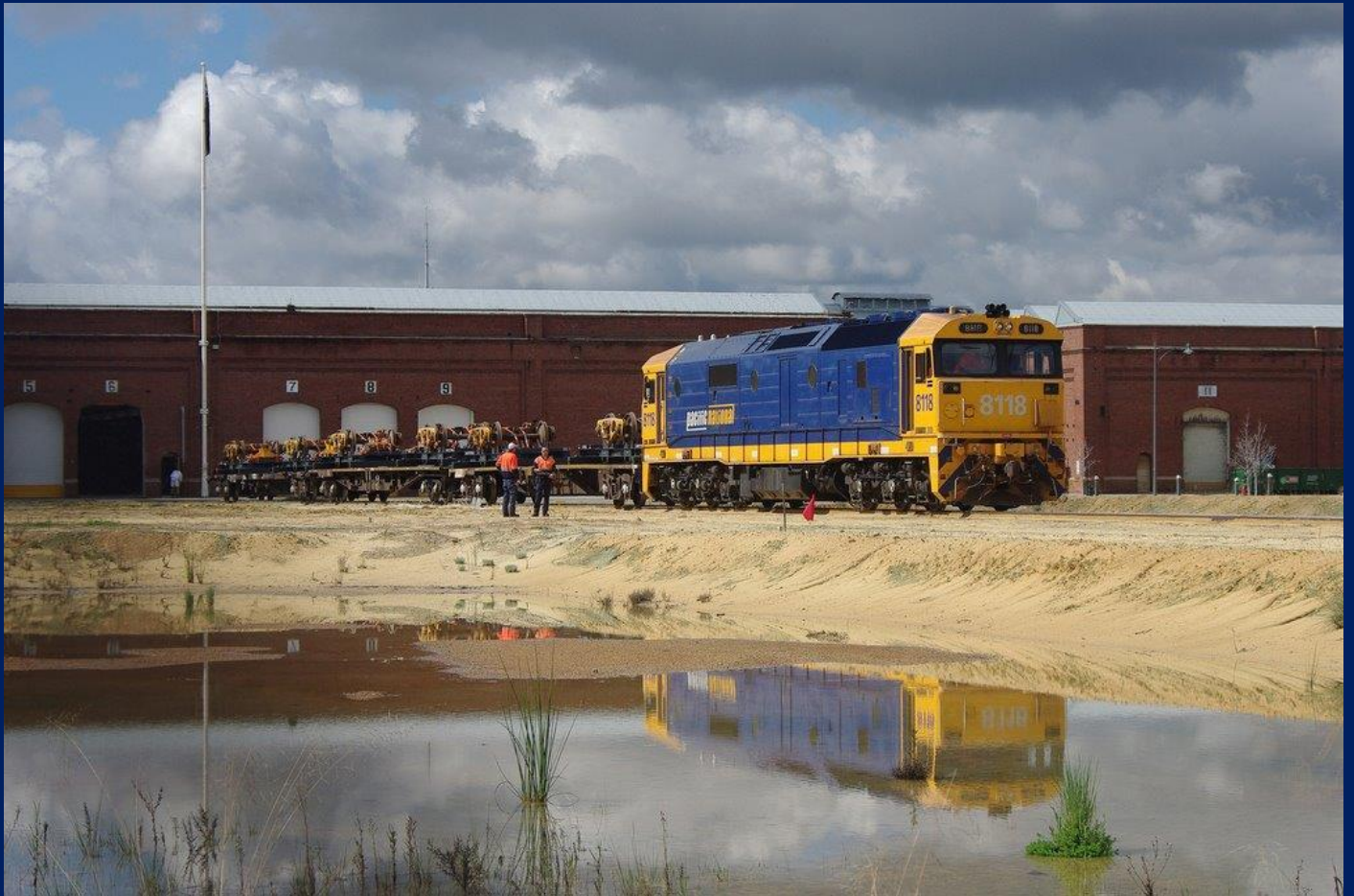
8118 on 4P31 shunter with three flattops of EMU s n/g transfer bogies at old Midland workshops 28/8.