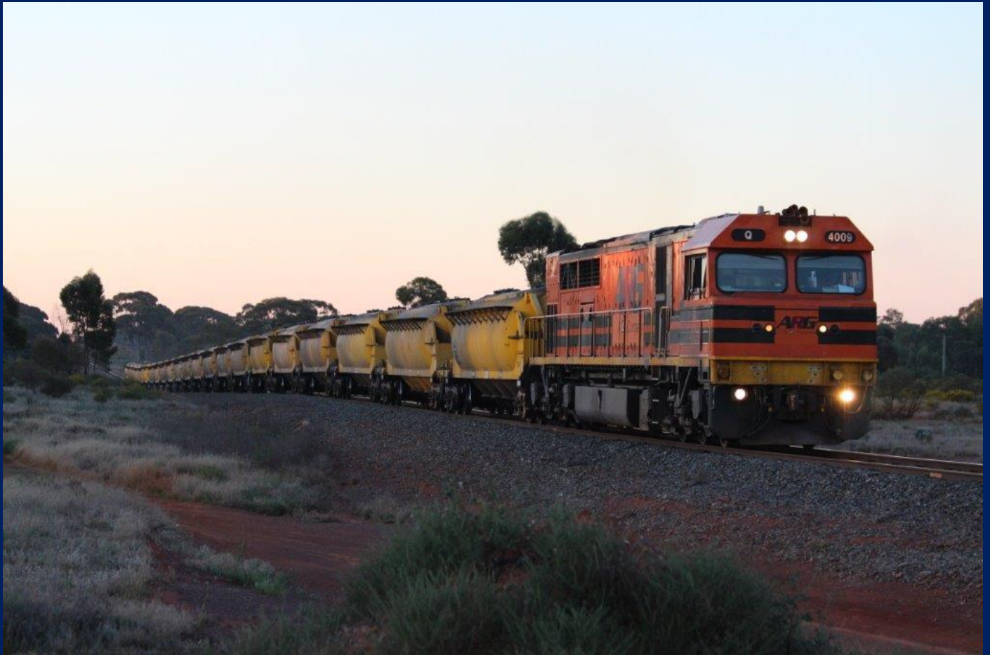
Q4009 on 7478 nickel train ex Leonora approaching Kalgoorlie August 24th.