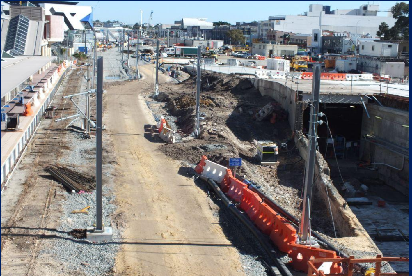
Platform 11 and Fremantle line track removed with work underway on platform 6 tunnel connection 4/8.