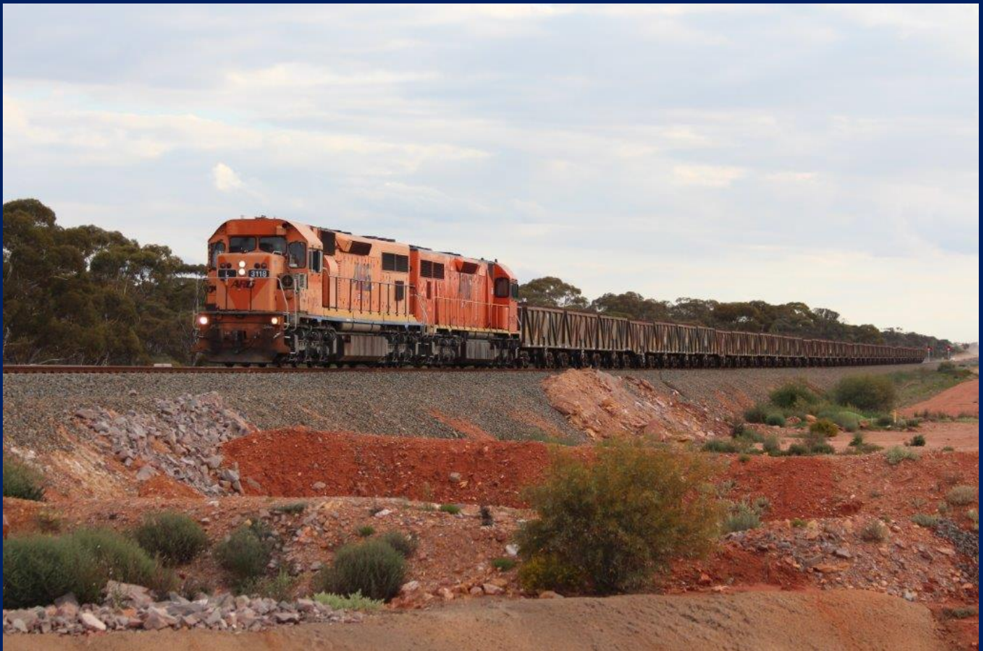
L3118 & LZ3119 on 2421 empty ore departing Binduli 19/08, with 42 OPAY cut down ex Leigh Creek coal wagons, been stored, were returned to service to cover ore cars destroyed in May.