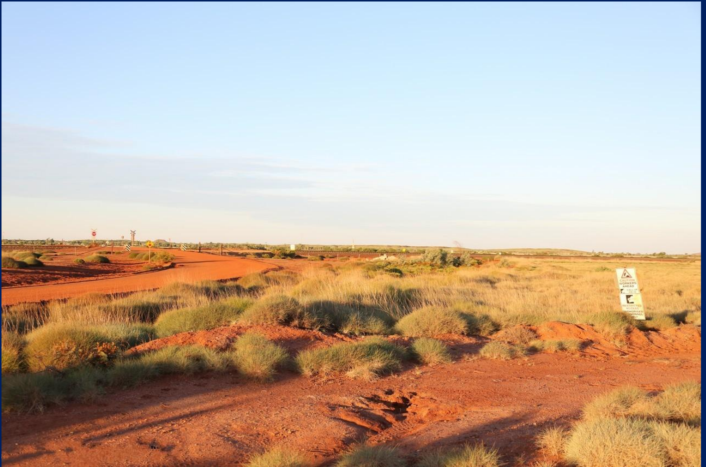
Roy Hill line alignment, FMG line Indee Road level crossing in background 15/8.