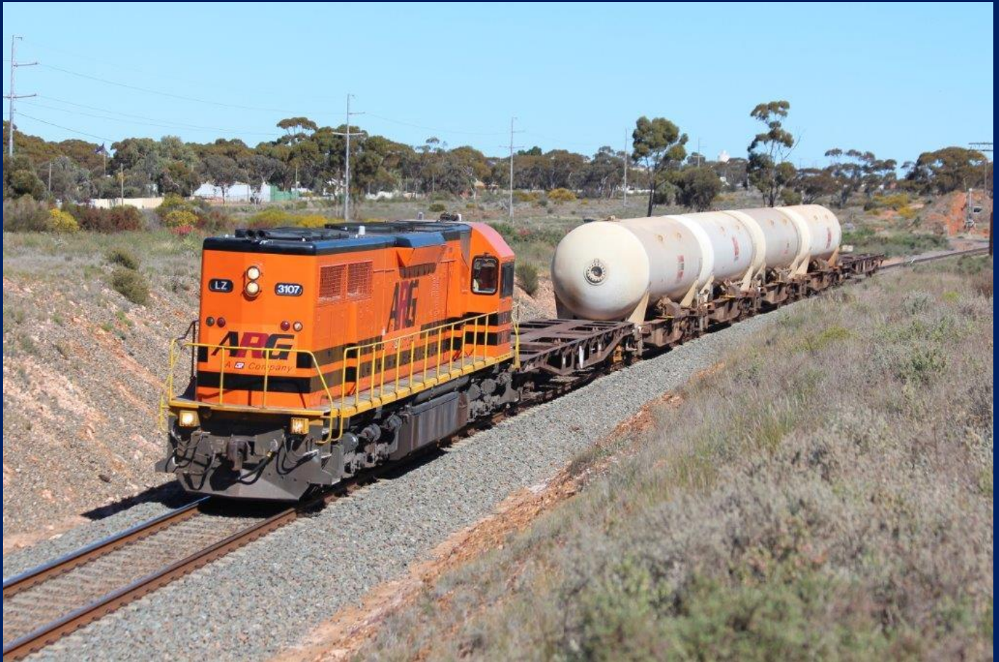
LZ3107 on 7027 anhydrous ammonia takers to West Kalgoorlie to Malcolm 24/08.