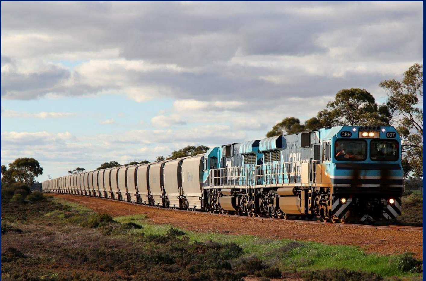
CBH007 & CBH008 just south of Latham on only Midwest Tier3 line to Maya 10/8.