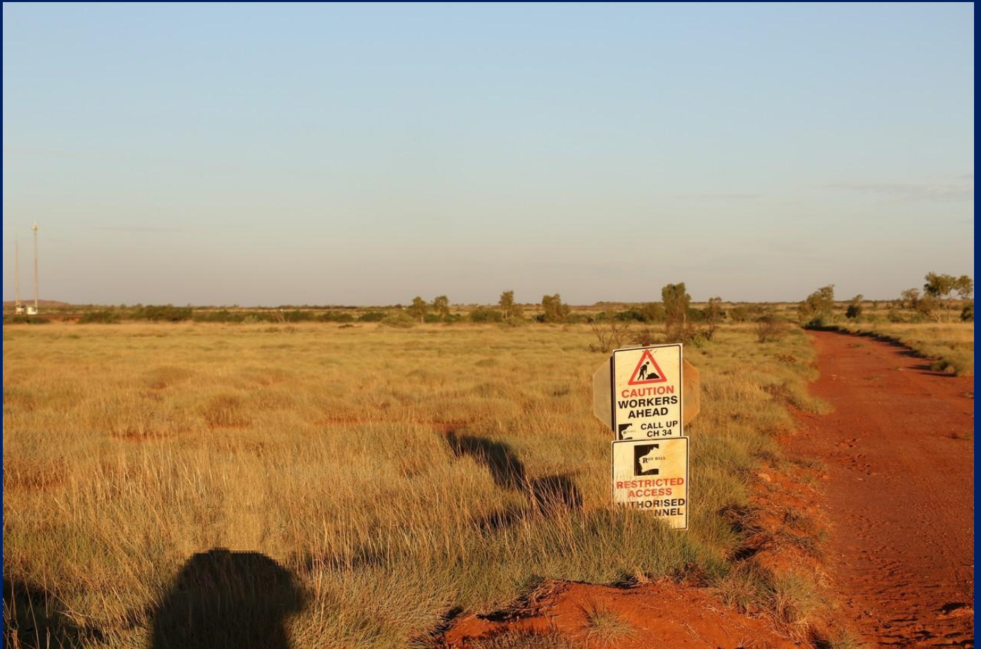
Roy Hill line alignment on Indee Station in Pilbara looking south August 15th.