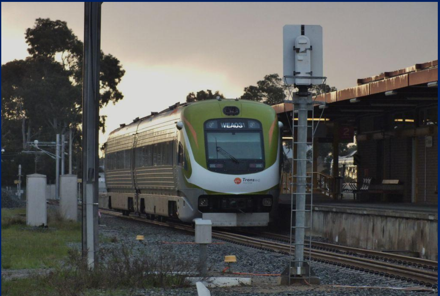
Avonlink railcars wait on platform 1 Midland Station 30/8 for the run to Northam.