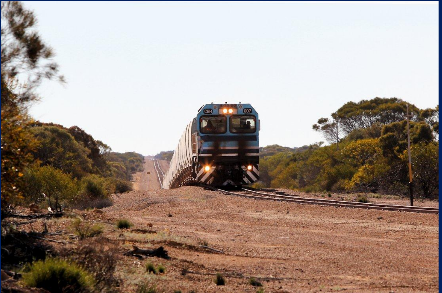
CBH007 climbs last grade before reaching Bunjil on Tier3 line south of Perenjori 24/8.