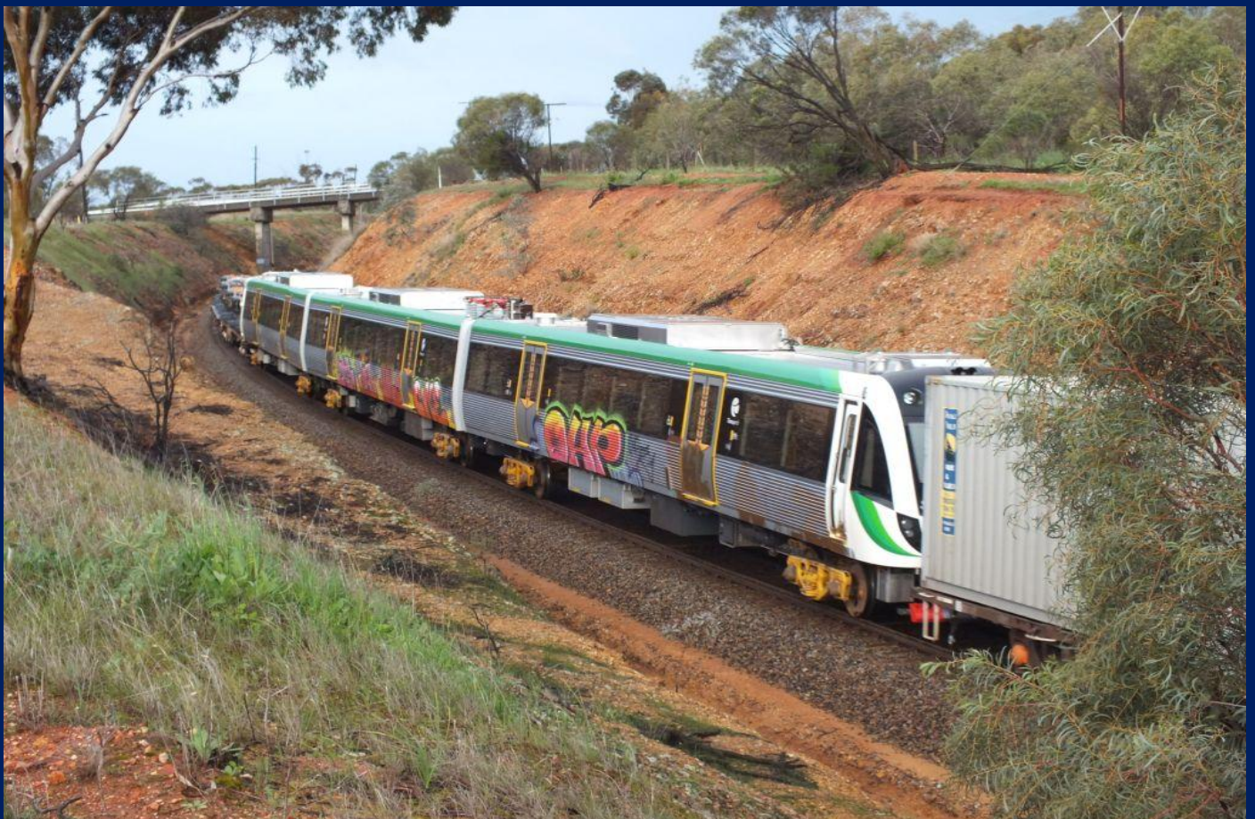
EMU set 095 on rear on 2NP3 steel train at Grass Valley August 15th.