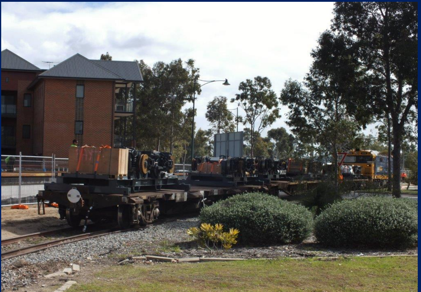
EMU set 095 power bogies being propelled to old workshops past new apartment site 16/8.