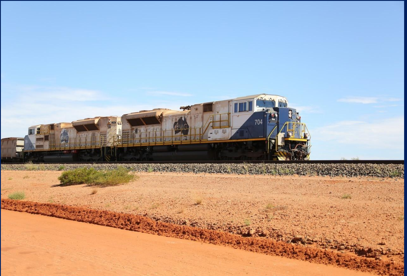
FMG 704 & 710 running on east track of now duplicated line 15/8.