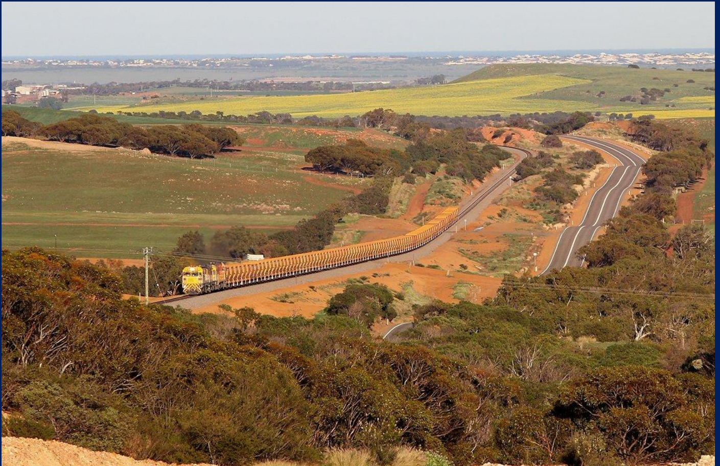
DFZ2407, DFZ2404 & 2512 on 7720 empty Perenjori ore at Bringo with Geraldton city and Indian Ocean in the far distance with hill covered in canola August 3rd.