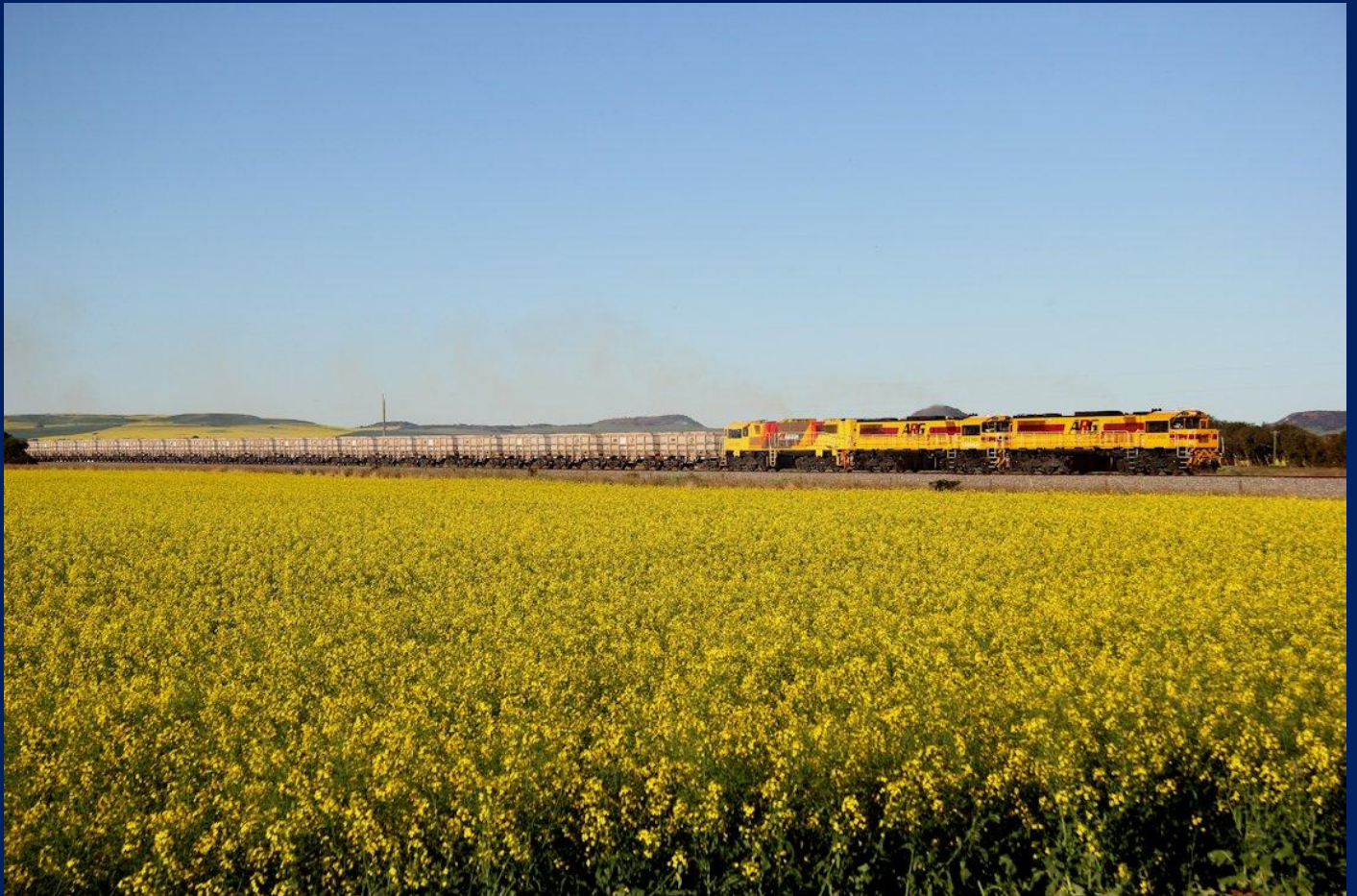
DFZ2405, DFZ2401 & DFZ2402 on loaded Karara Mining ore ex Perenjori passing canola at Narngulu 3/8.