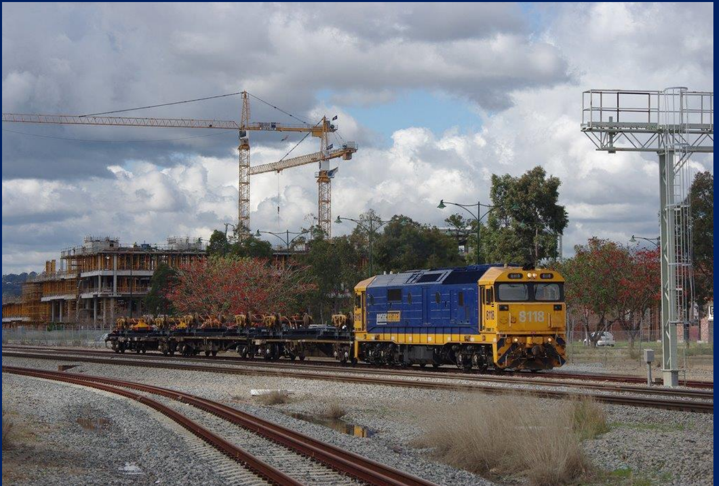
8118 departing Midland for PTF Kewdale transfer bogies to return to Qld 28/8.