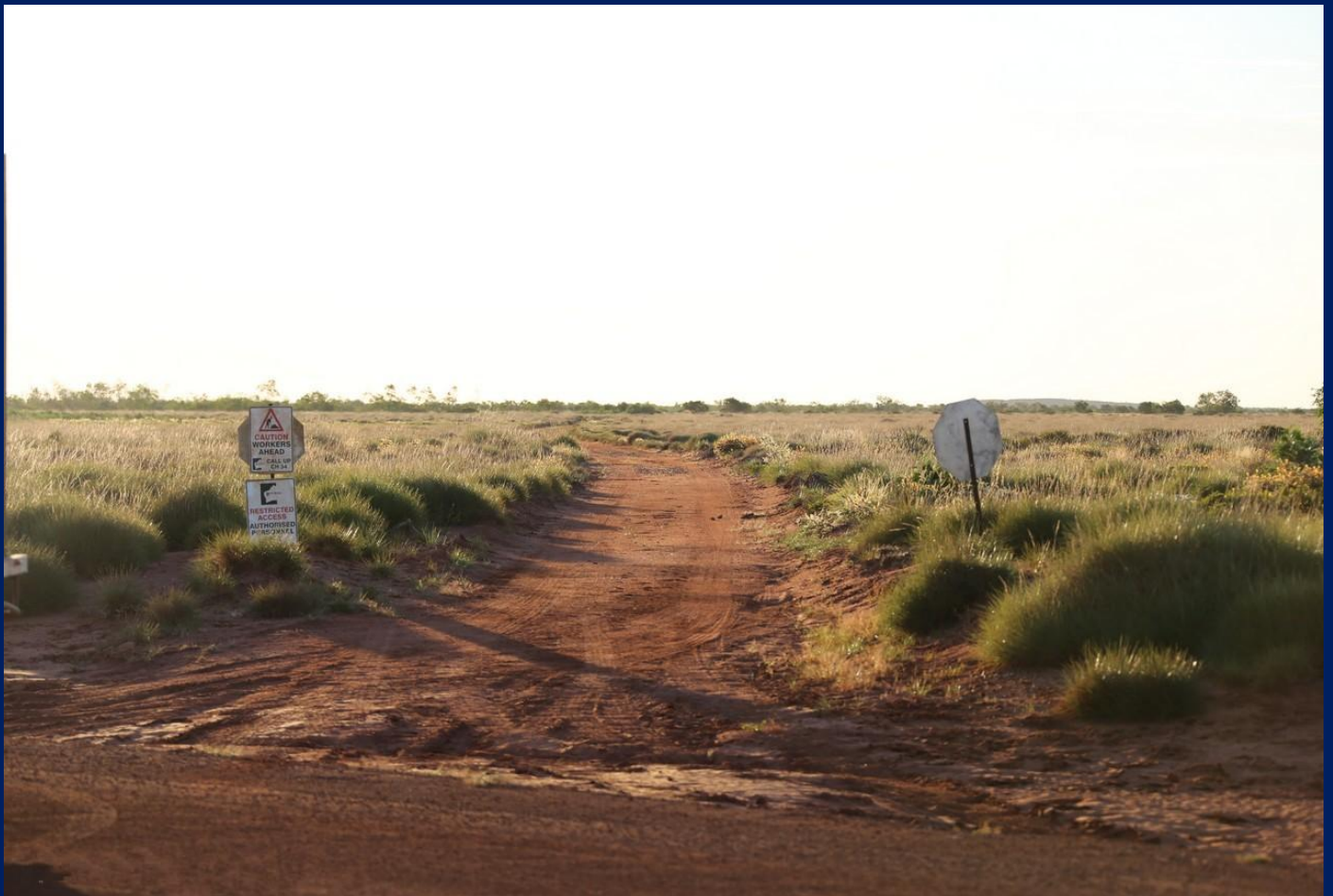
Roy Hill line alignment on Indee Station in Pilbara looking north August 15th.