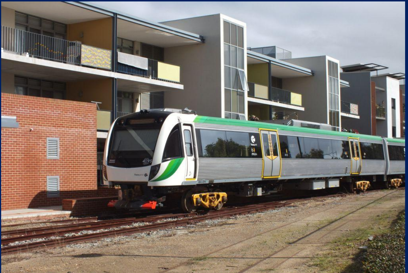
EMU car 4095 is propelled past block of home units in what was Midland workshops yard 16/8.