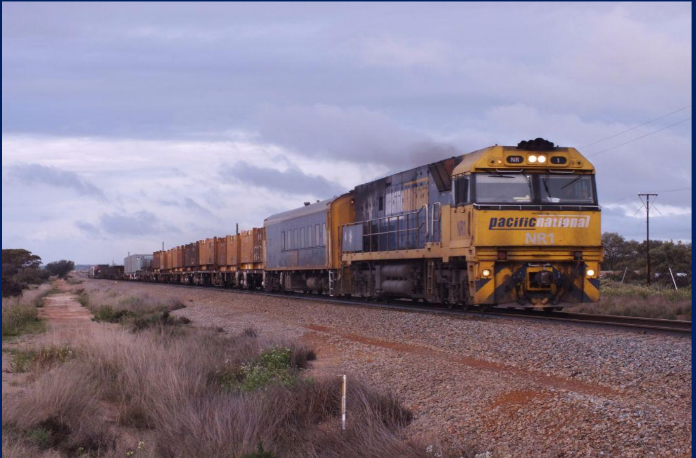
NR1 on 2NP3 with EMU set 095 on rear at Wyola West August 15th.