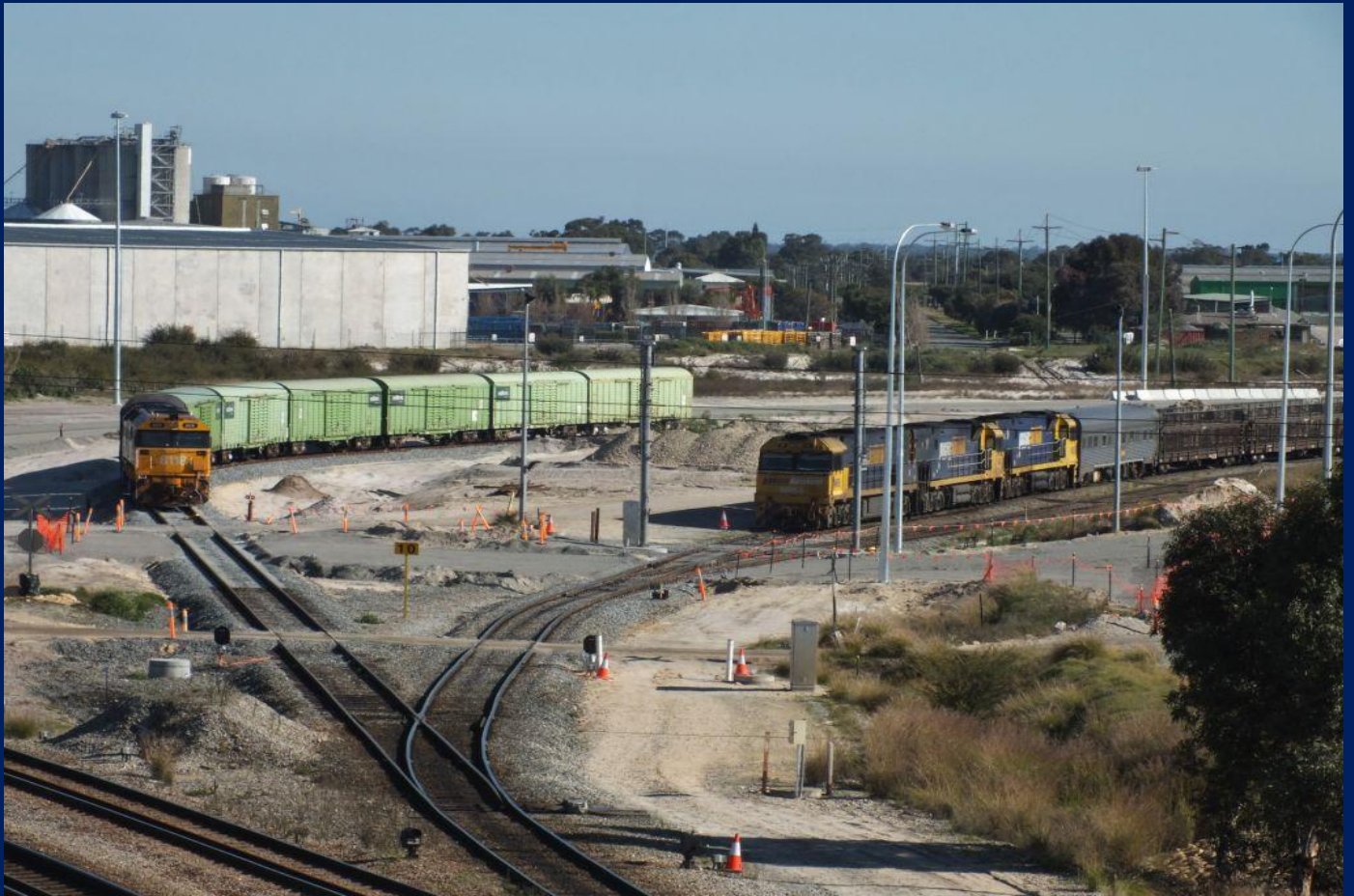
8118 on Sadleir vans and NR68, NR47 dead NR35 on 7PM5 at PFT Kewdale waiting to depart 3/8.