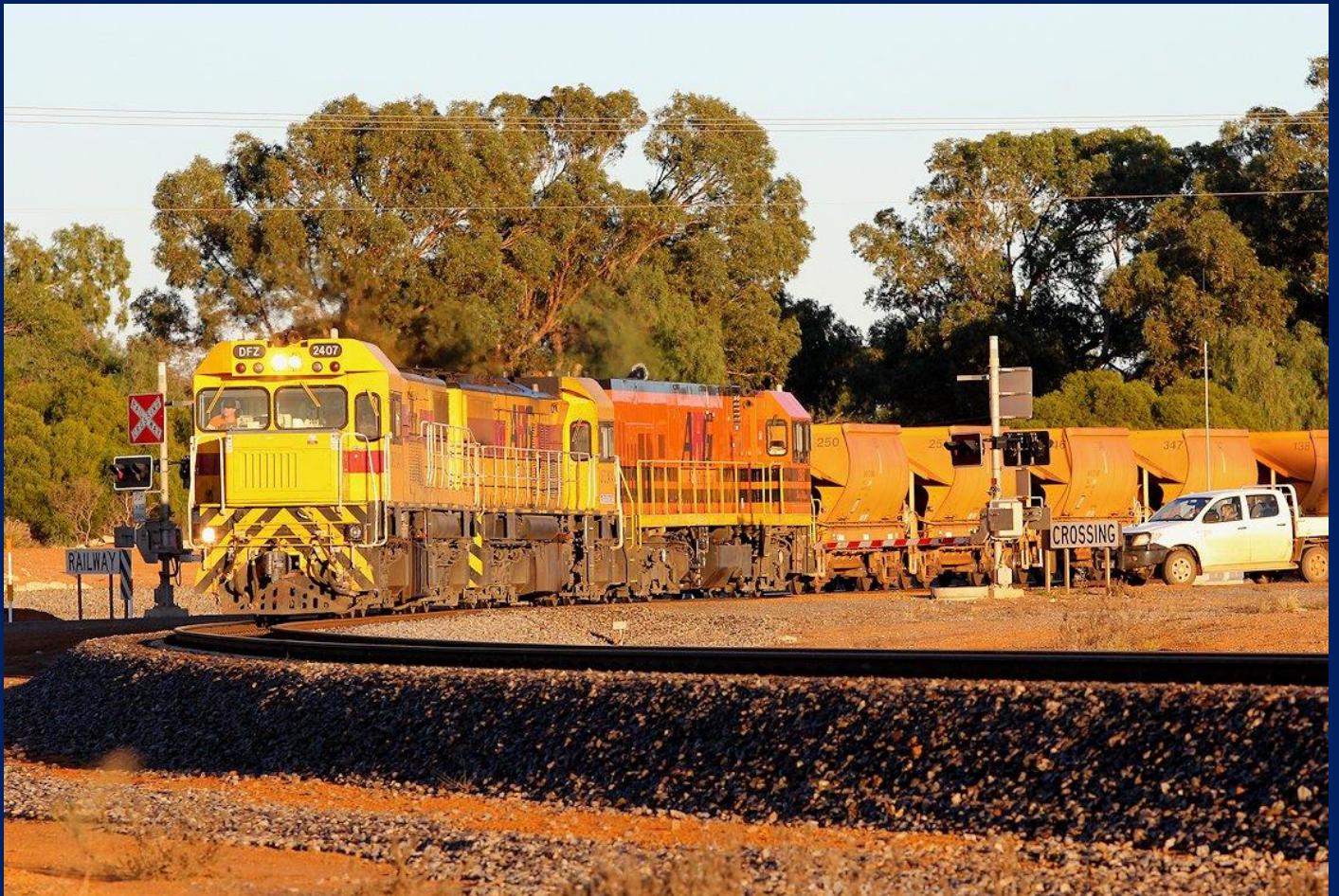
DFZ2407, DFZ2404 & 2512 on empty ore rounding curve south end Narngulu 3/8.