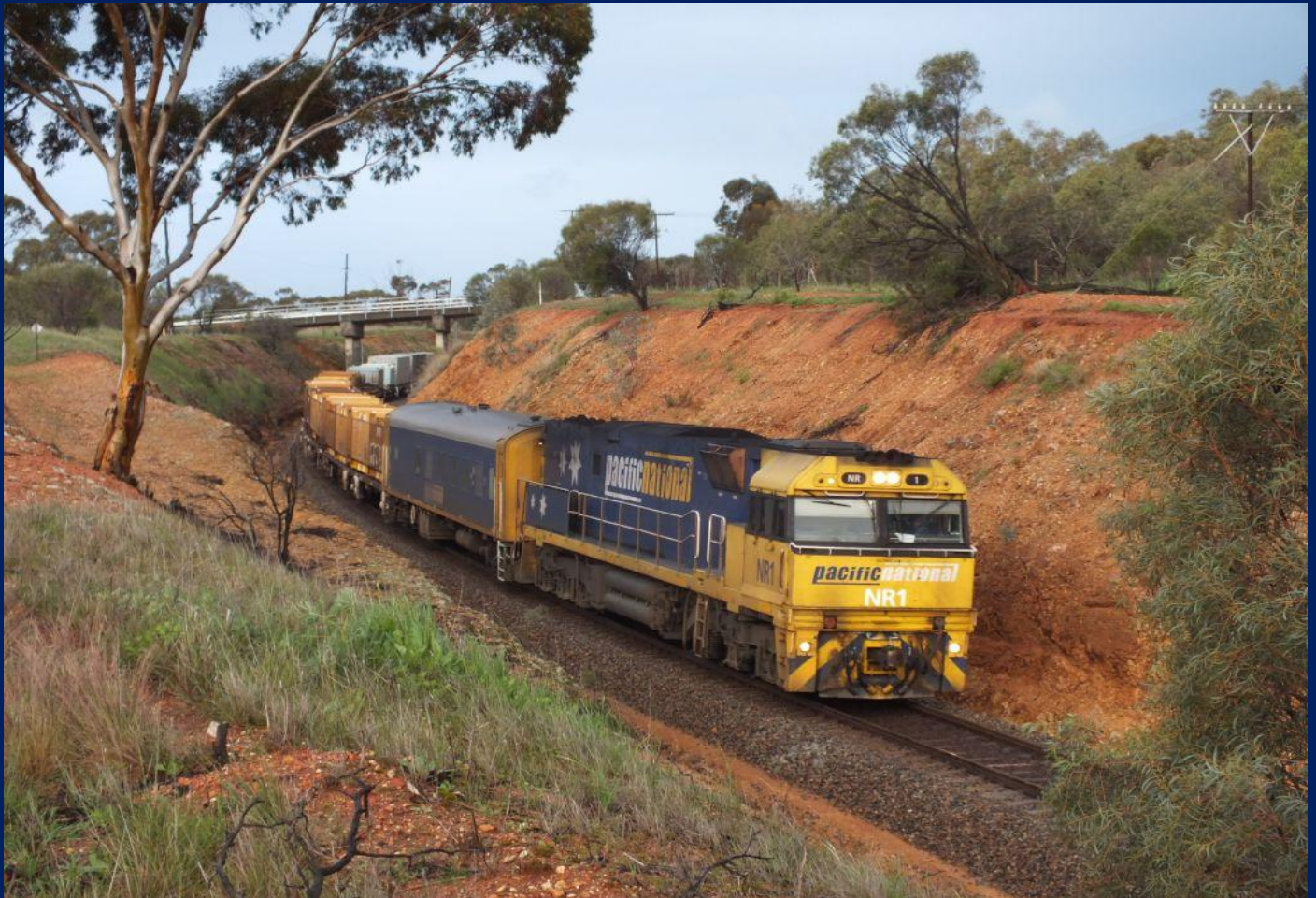
NR1 on 2NP3 steel train entering Grass Valley to cross 5PM5 in loop August 15th.