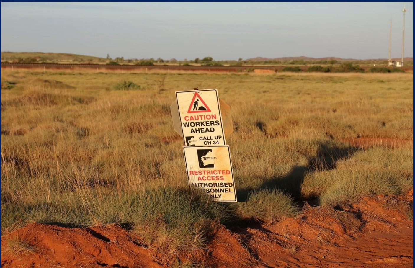
Roy Hill line alignment, FMG line in background on Indee Station in Pilbara 15/8.