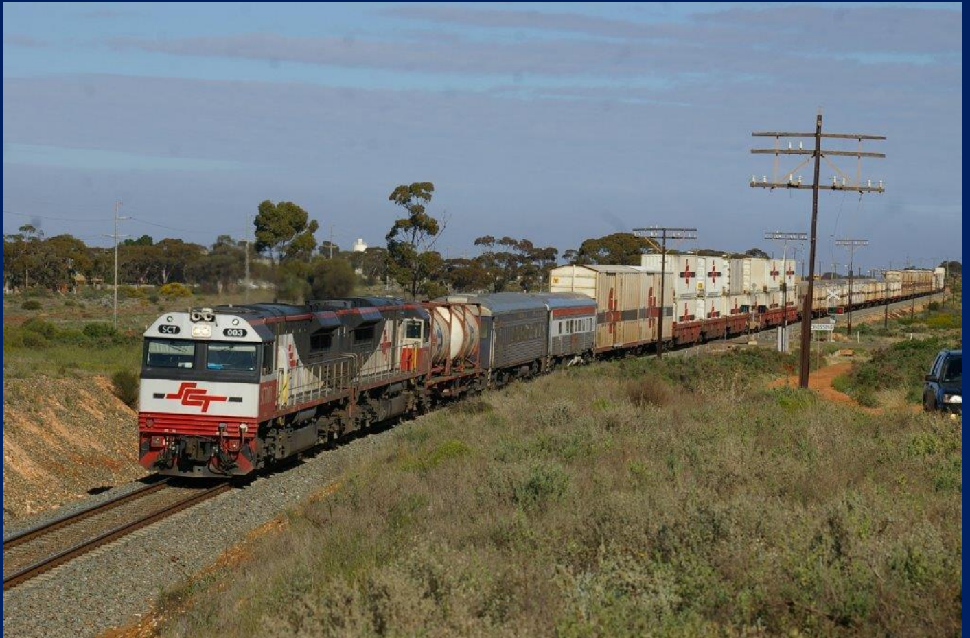
SCT003 & SCT on 6PM9 with two crew cars, departing Wet Kalgoorlie August 10th.