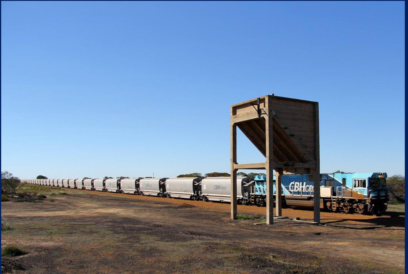
CBH007 passing old Caron concrete coal stage south of Perenjori August 24th.