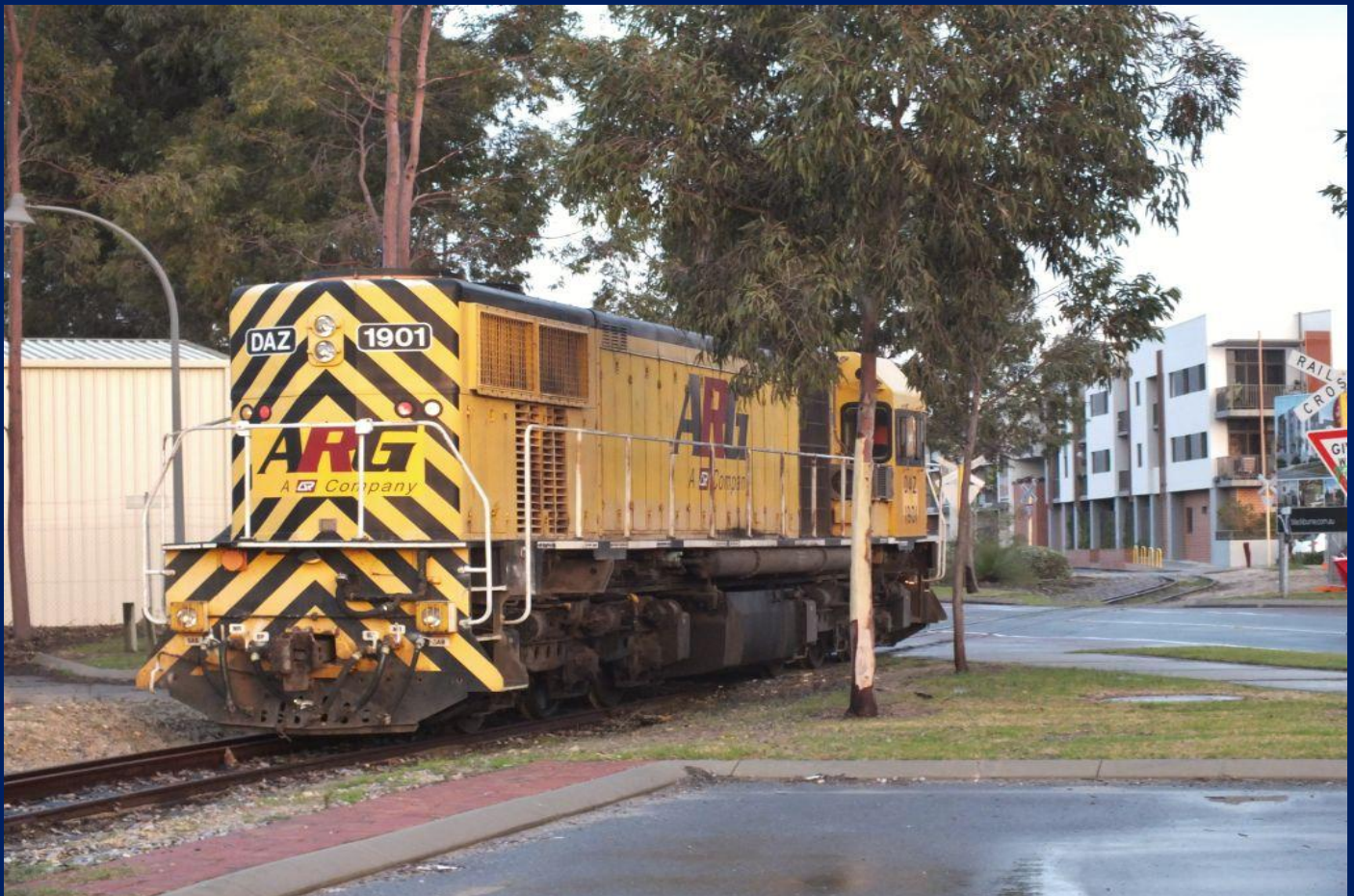
DAZ1901 first Aurizon locomotive to cross Yelverton St Midland on 30/8 to enter old workshops for years.