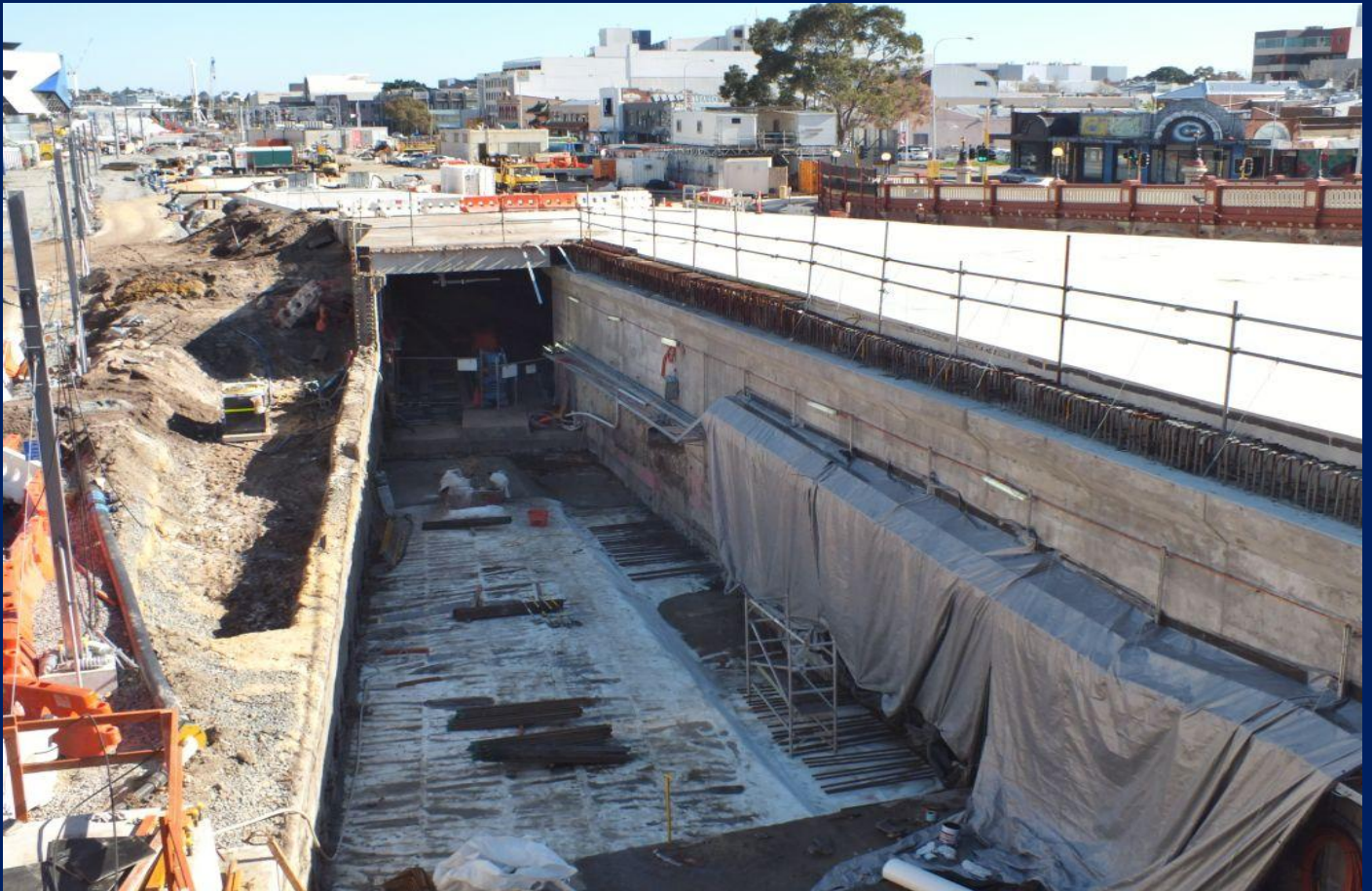
Fremantle line tunnel connection to Platform 6 under construction August 4th.