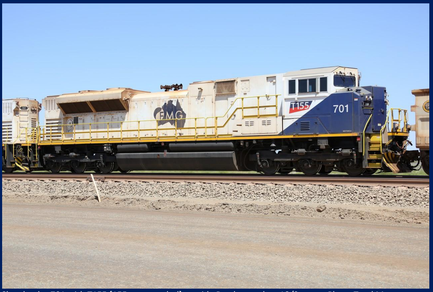
Class leader 701 with T155 [155mtpa symbol] outside Rowley yard on 18/9.