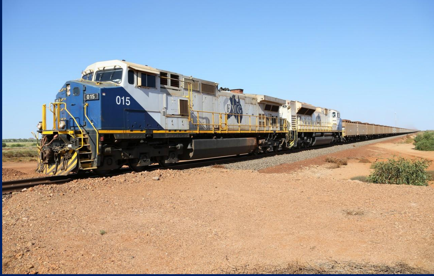
CW44-9W 015 & SD70ACe 716 at 48.2km with loaded ore of Indee Road 17/09.