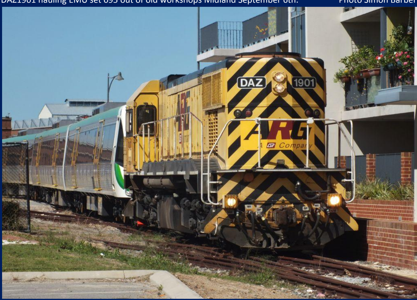
DAZ1901 with EMU 095 passing big apartment block after departing old workshops 6/09.