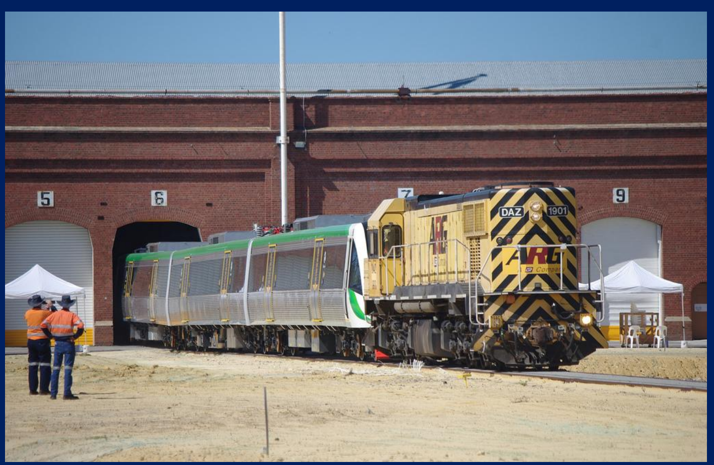
DAZ1901 hauling EMU set 095 out of old workshops Midland September 6th.