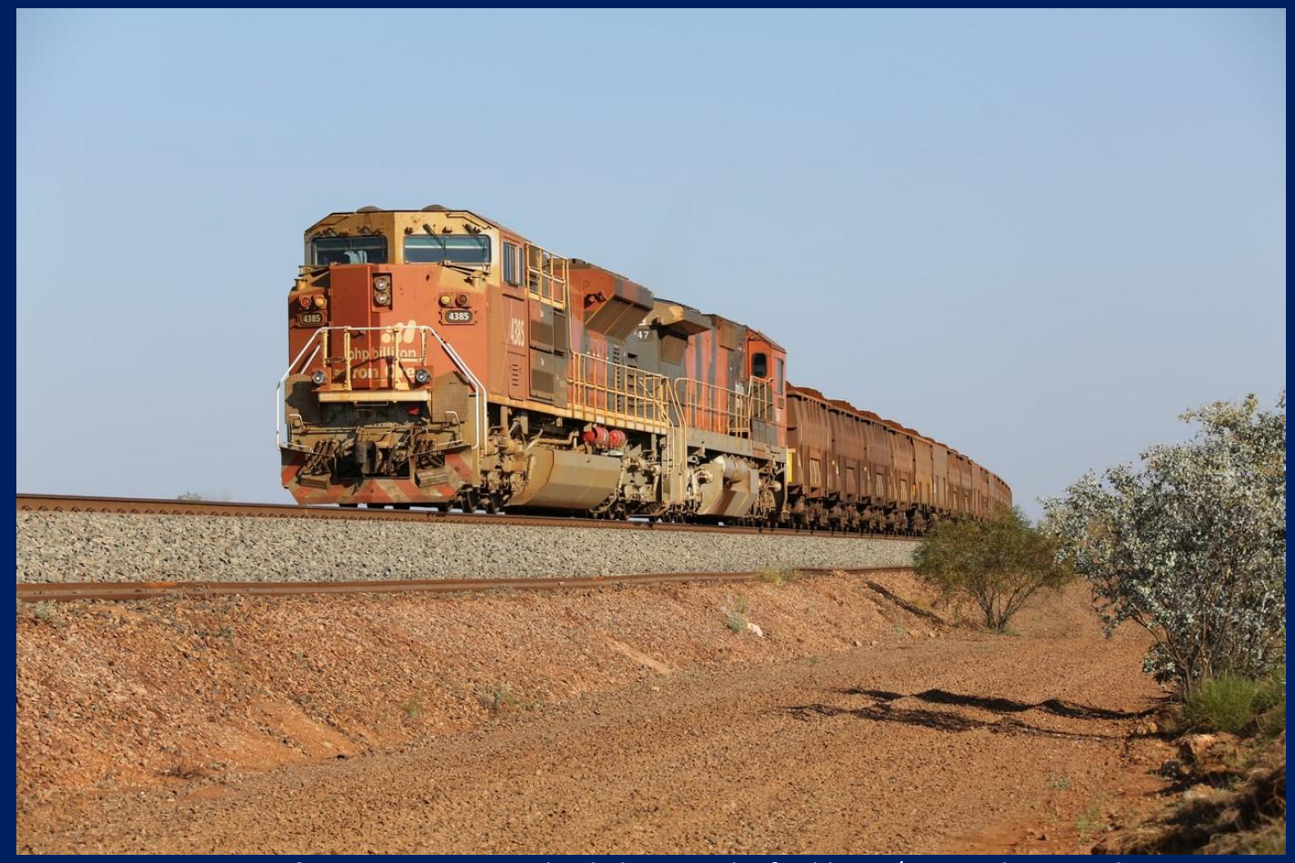
BHPBIO SD70ACe 4385 & CM40-8M 5647 on loaded ore south of Tabba 19/09.