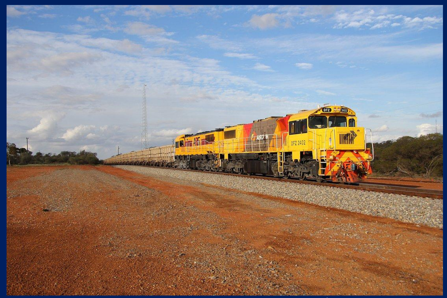
DFZ2404 & DFZ2402 on loaded Karara ore from Perenjori departing Mullewa 7/09.