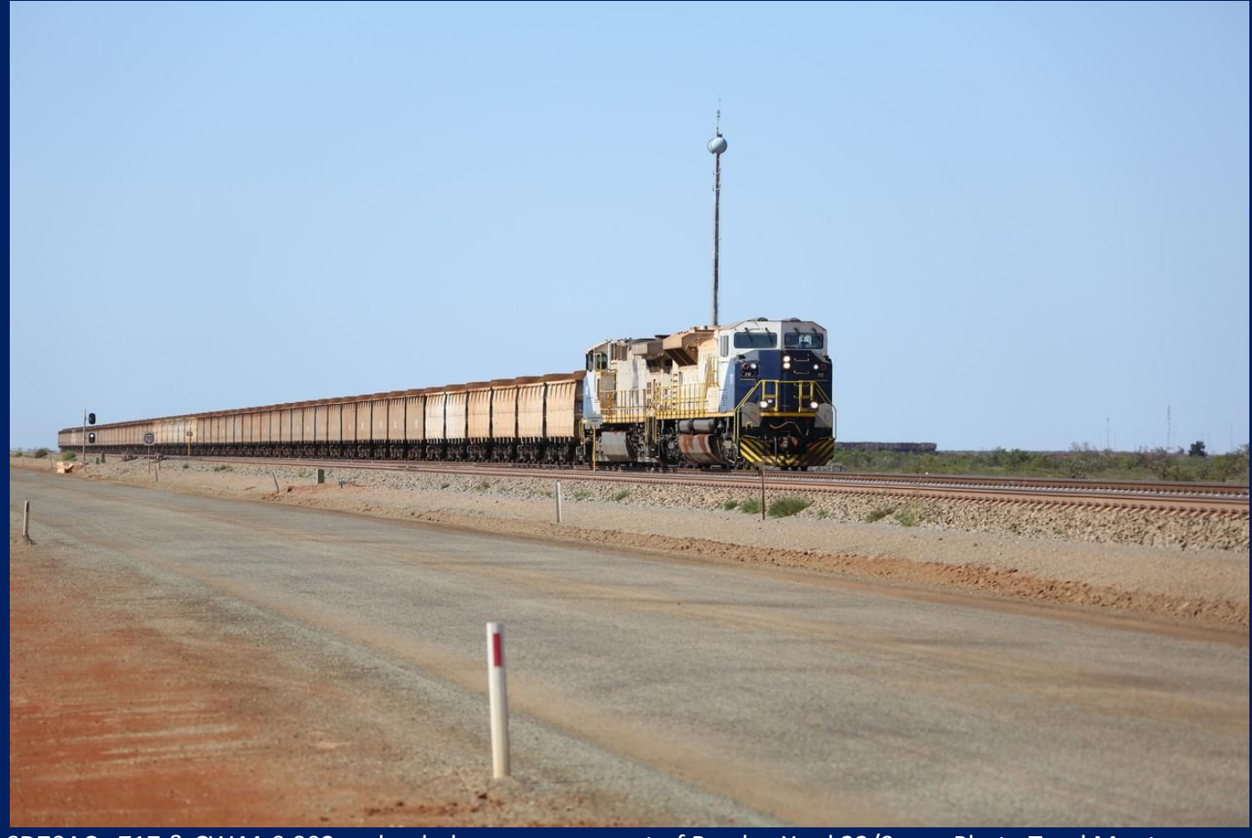
SD70ACe 717 & CW44-9 002 on loaded ore on curve out of Rowley Yard 22/9.