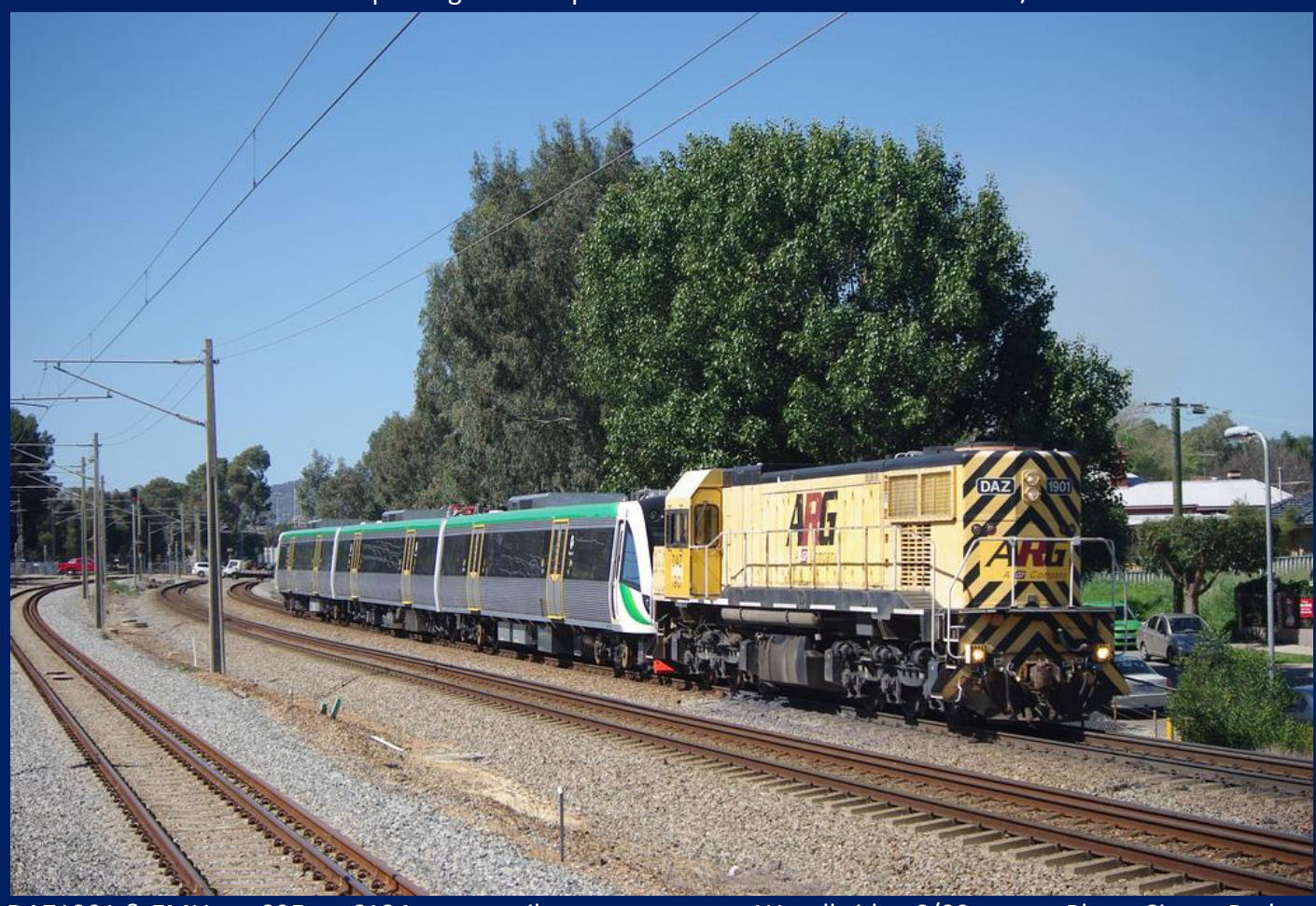
DAZ1901 & EMU set 095 on 6134 empty railcar movement at Woodbridge 6/09.