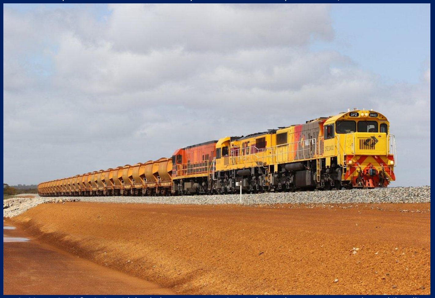
DFZ2402, DFZ2406 & P2507 with loaded ore at Dean on September 15th.