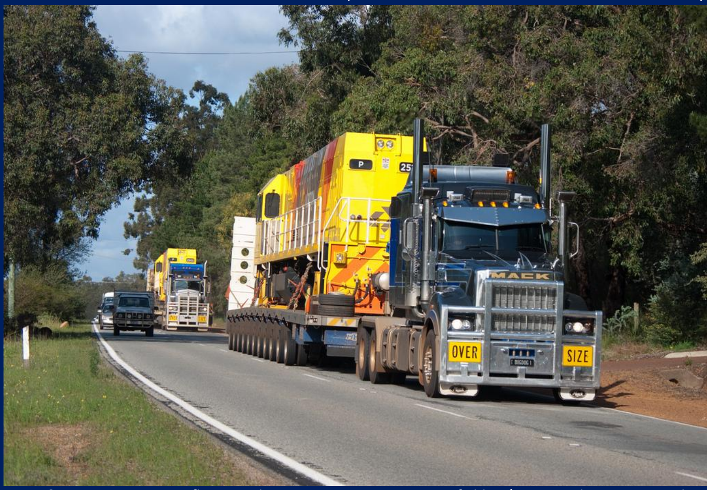
P2517 & P2505 on transport floats at Glenn Forrest on way to Forrestfield 15/9.