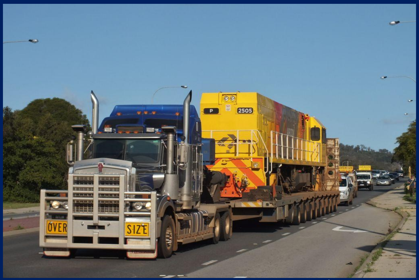
P2505 on transport float at Greenmount on way to Forrestfield after repair in Qld 15/9.