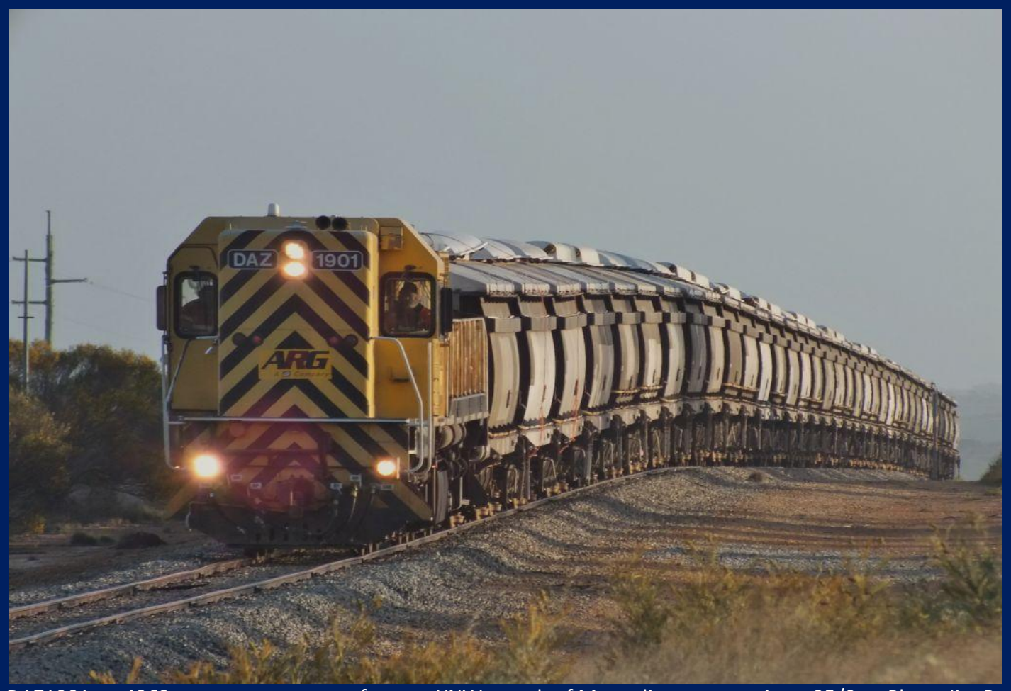
DAZ1901 on 4362 wagon movement of empty XNWs south of Merredin on run to Avon 25/9.