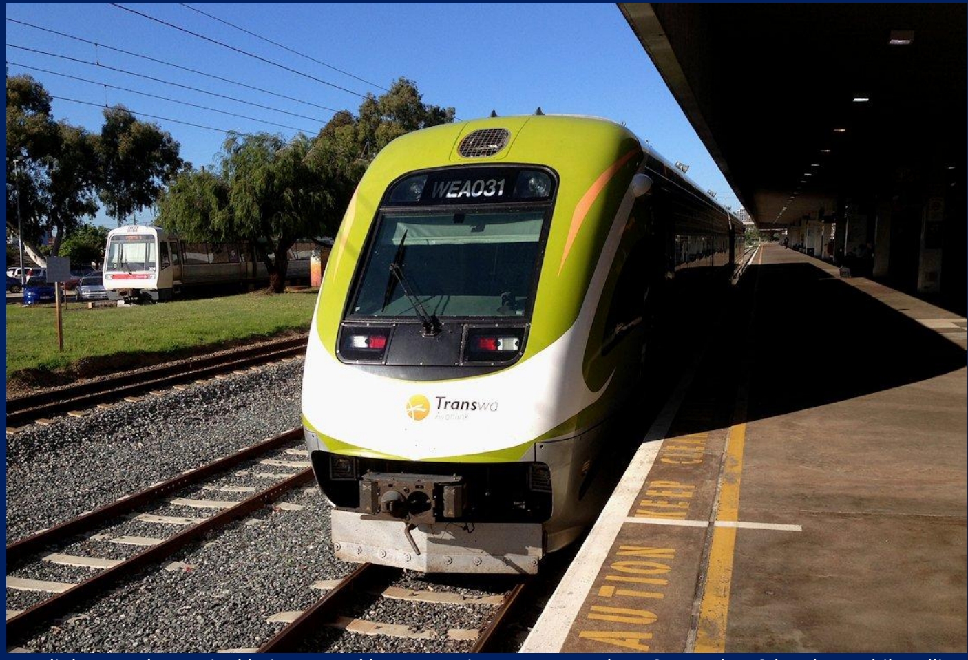
Avonlink at Perth Terminal being passed by an A series EMU to Perth on September 6th.