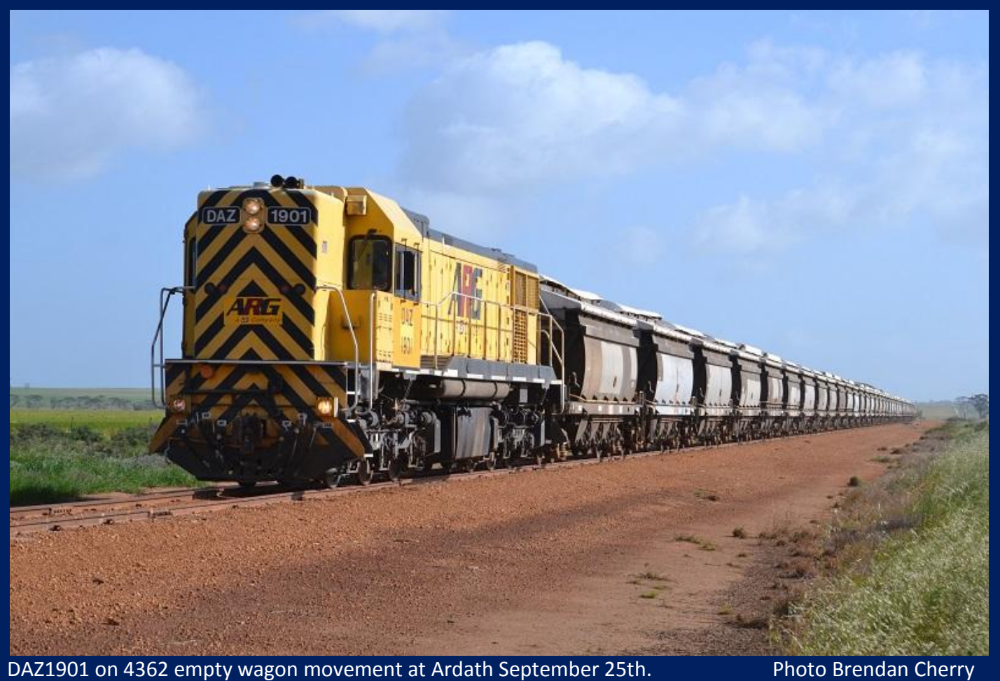
DAZ1901 on 4362 empty wagon movement at Ardath September 25th.