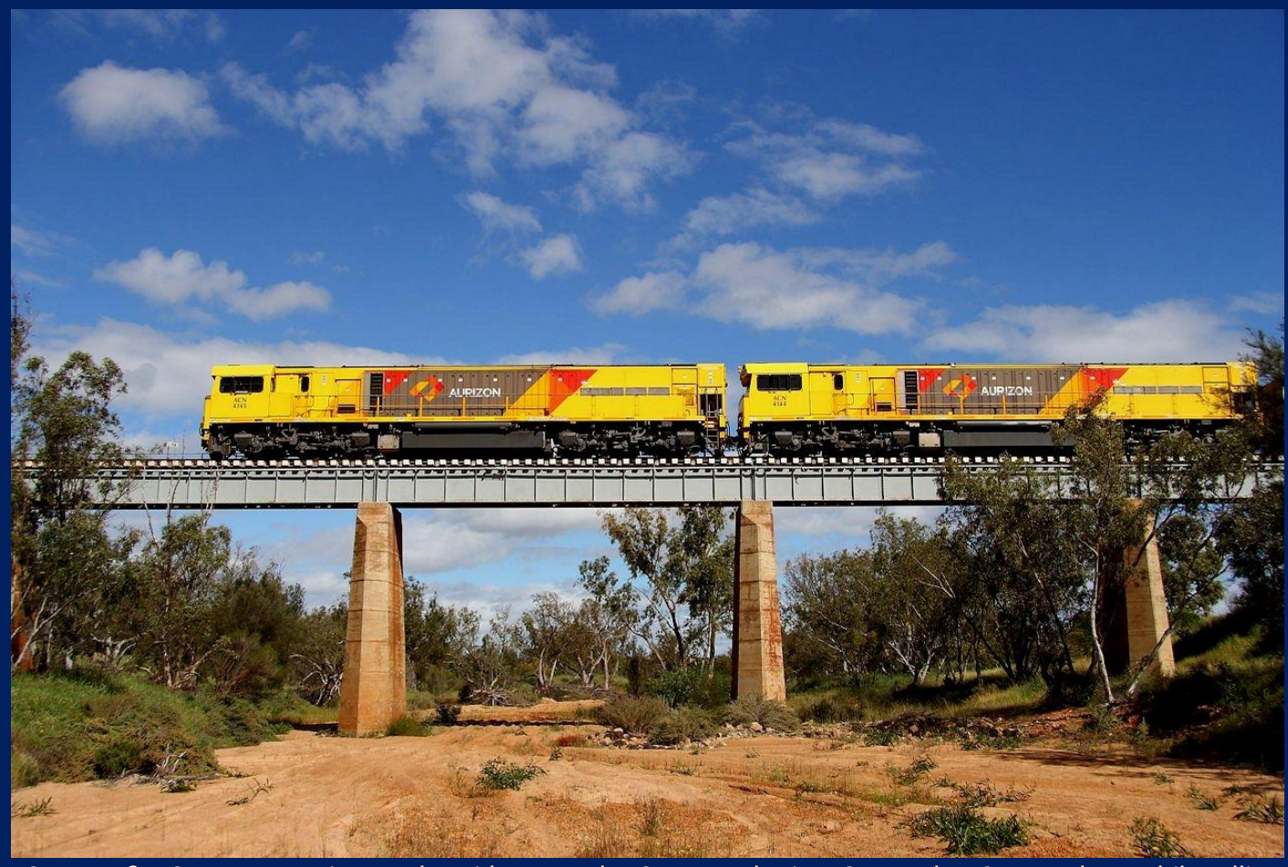
ACN4145 & ACN4144 crossing Eredu Bridge over dry Greenough River September 21st.