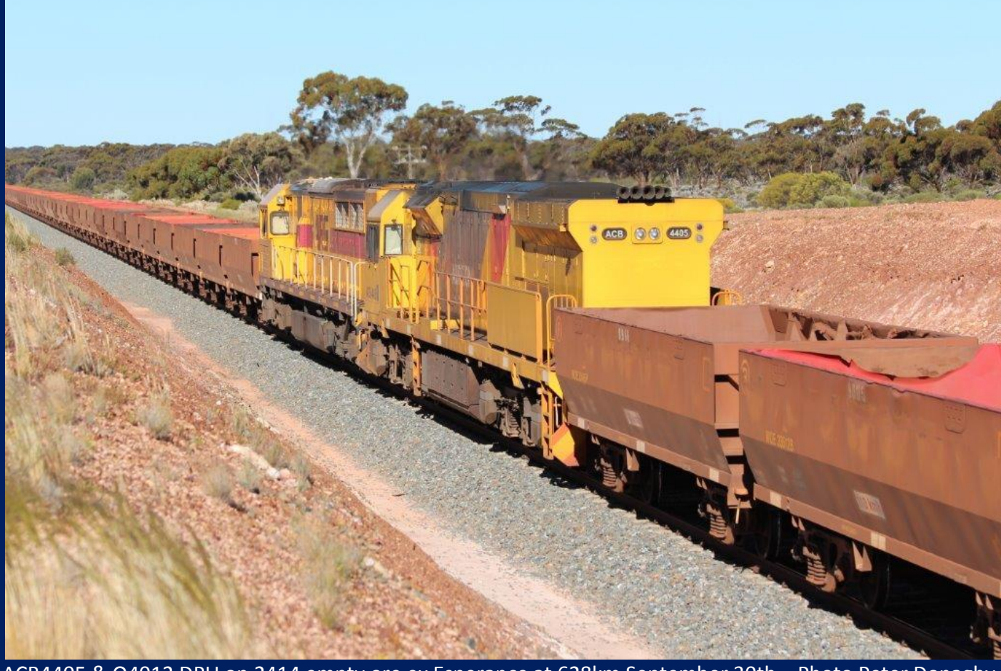
ACB4405 & Q4012 DPU on 2414 empty ore ex Esperance at 628km September 30th.