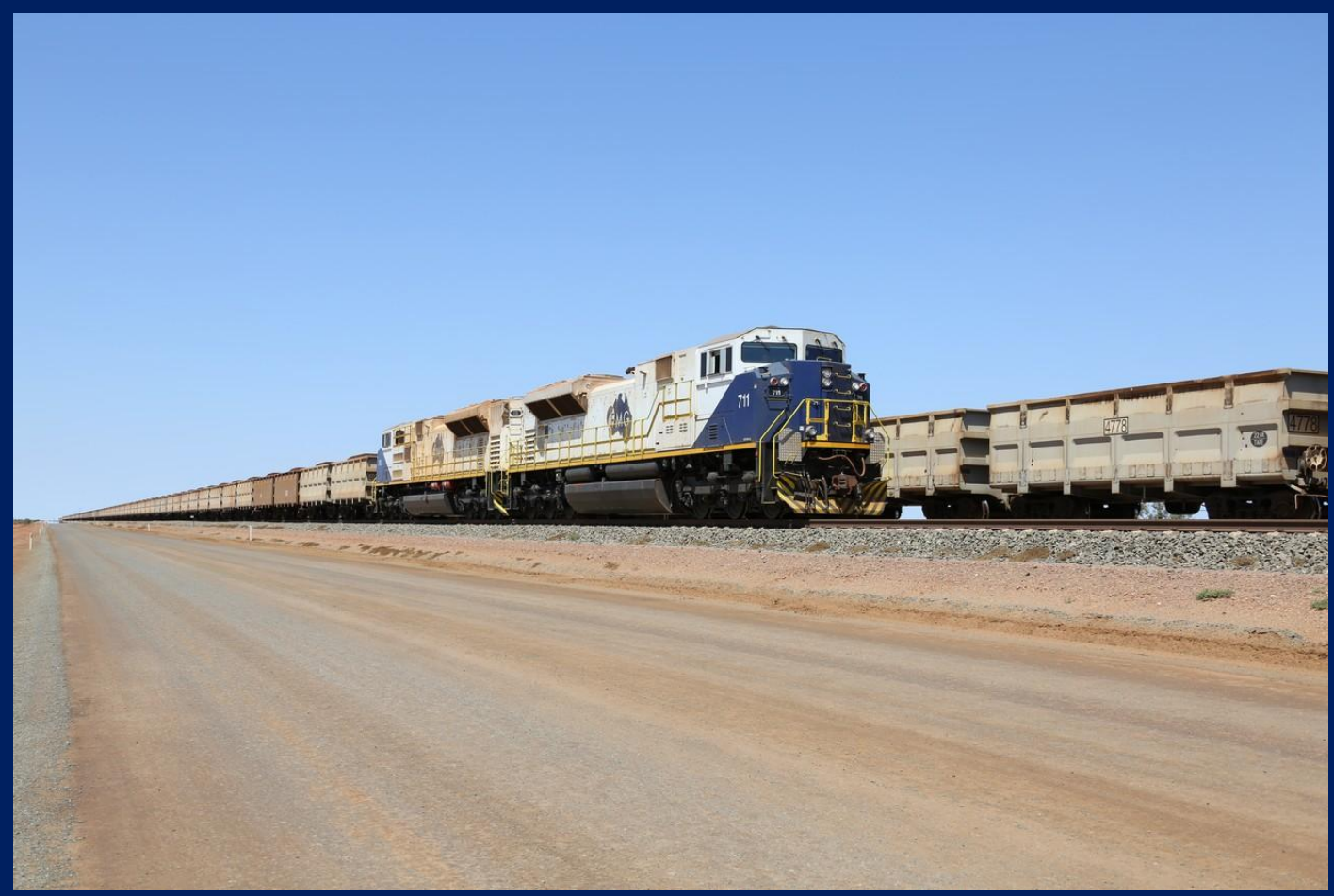
SD70ACe 711 & 715 on loaded ore passing empty on double track between Rowley and Kanyirri Yard 18/9.