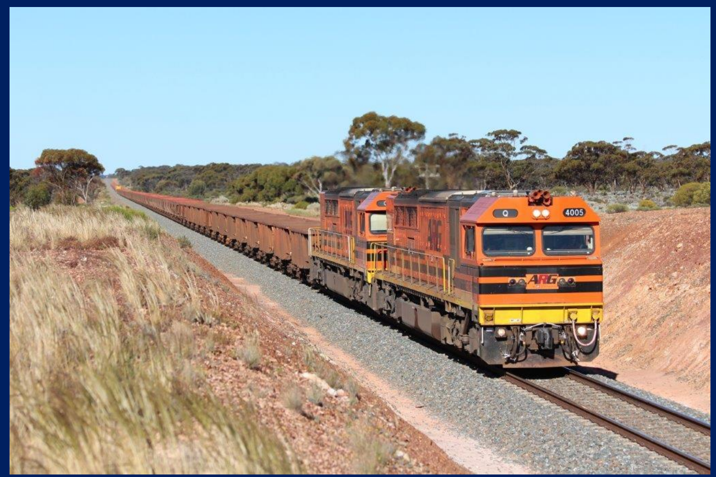
Q4005 & Q4004 on 2414 empty ore ex Esperance at 628km September 30th.