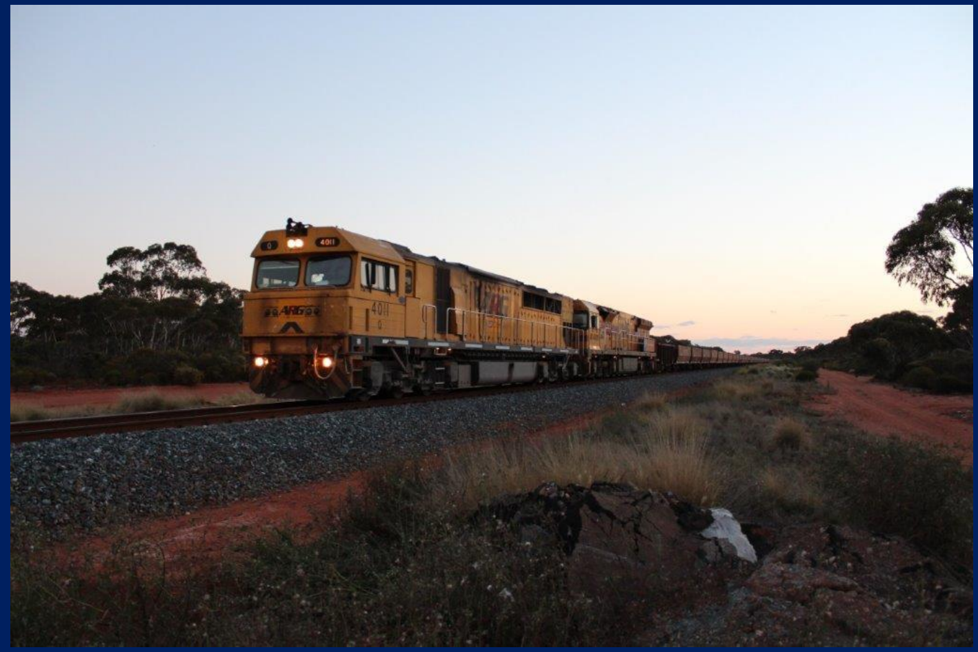
Q4011 & AC4308 on 1413 ore to Esperance at Binduli at dusk September 1st.