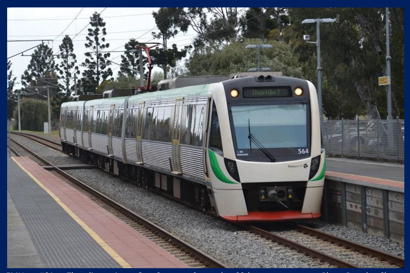
EMU set #64 on Thornlie service at Oats Street on September 29th.