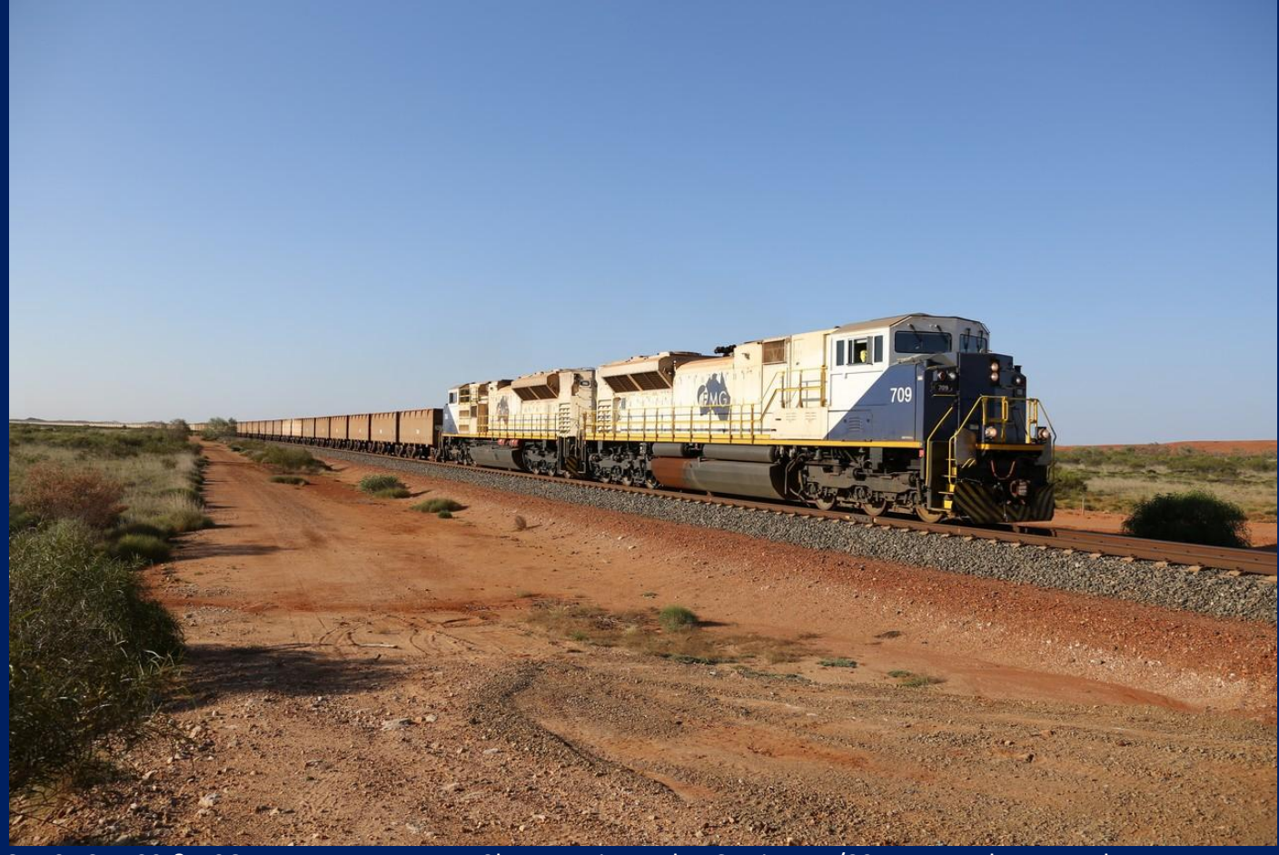
SD70ACe 709 & 706 on empty ore at 75.9km crossing Indee Station 17/09.