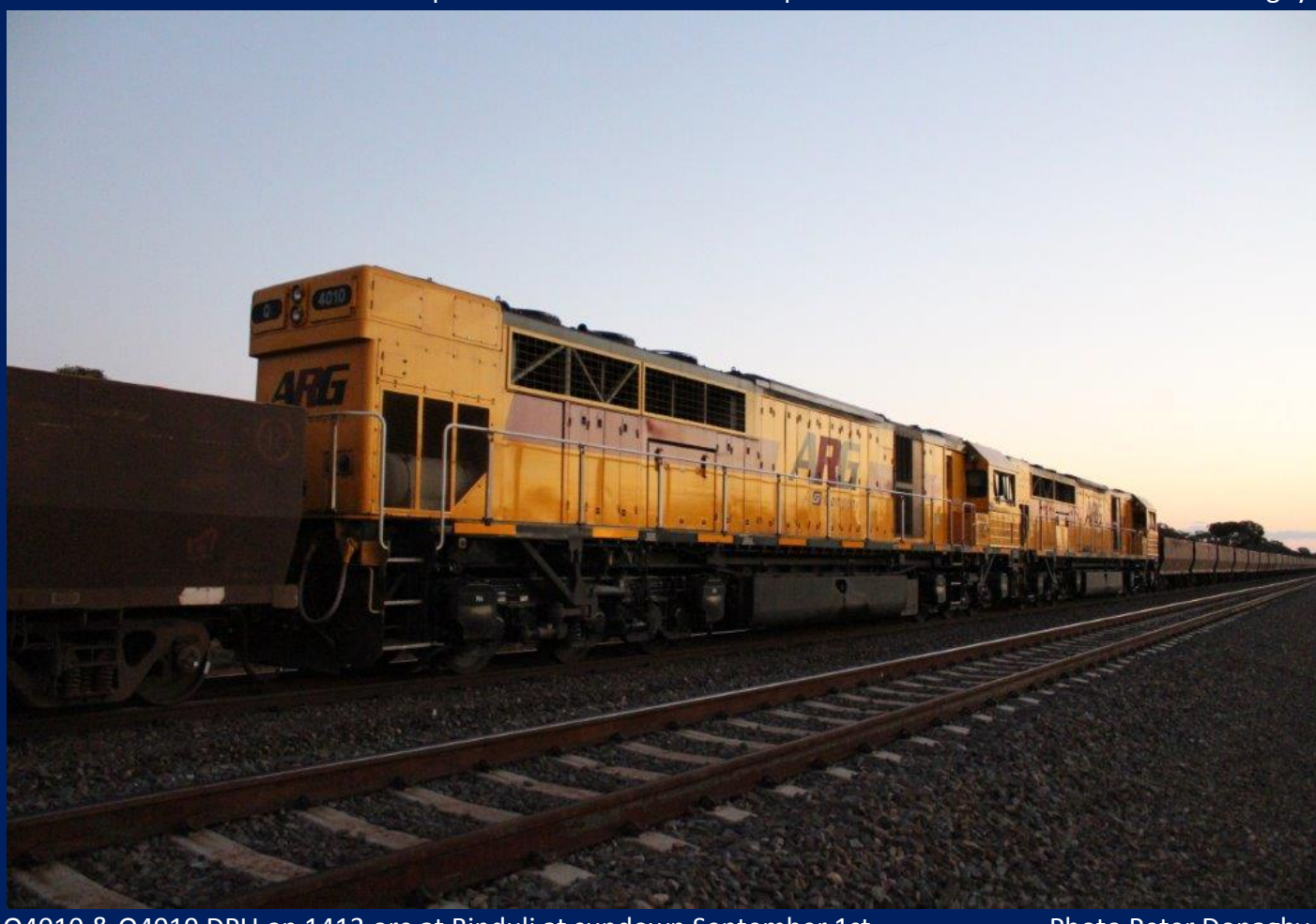
Q4010 & Q4019 DPU on 1413 ore at Binduli at sundown September 1st.