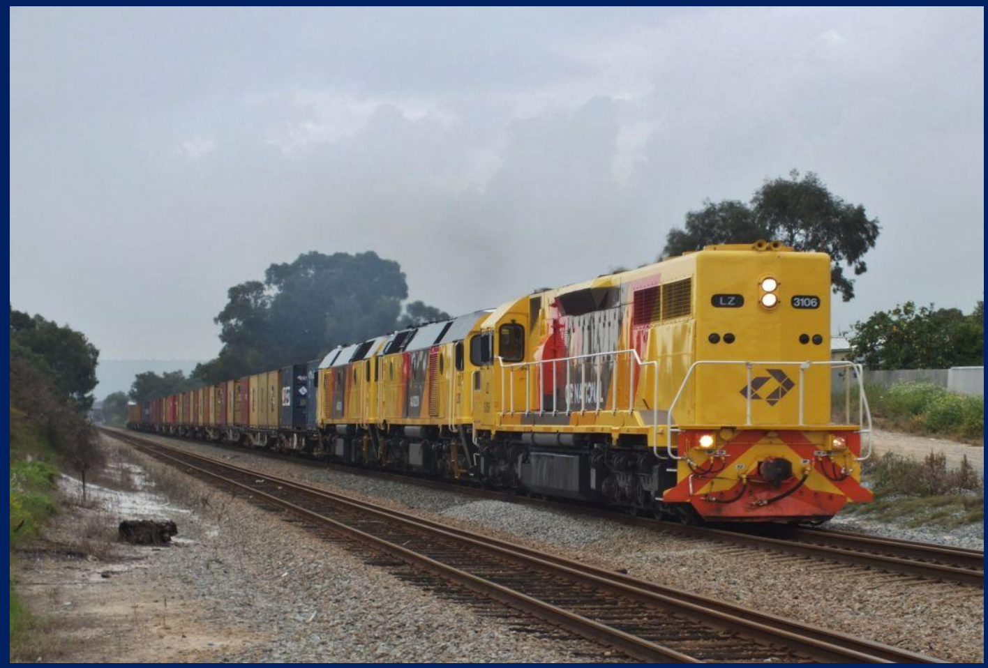
LZ3106, DC2205 & DC2213 on 2142 container train at Thornlie September 2nd.