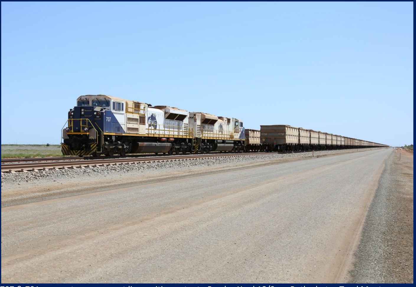
707 & 701 on empty ore on west line waiting entry to Rowley Yard 18/9.