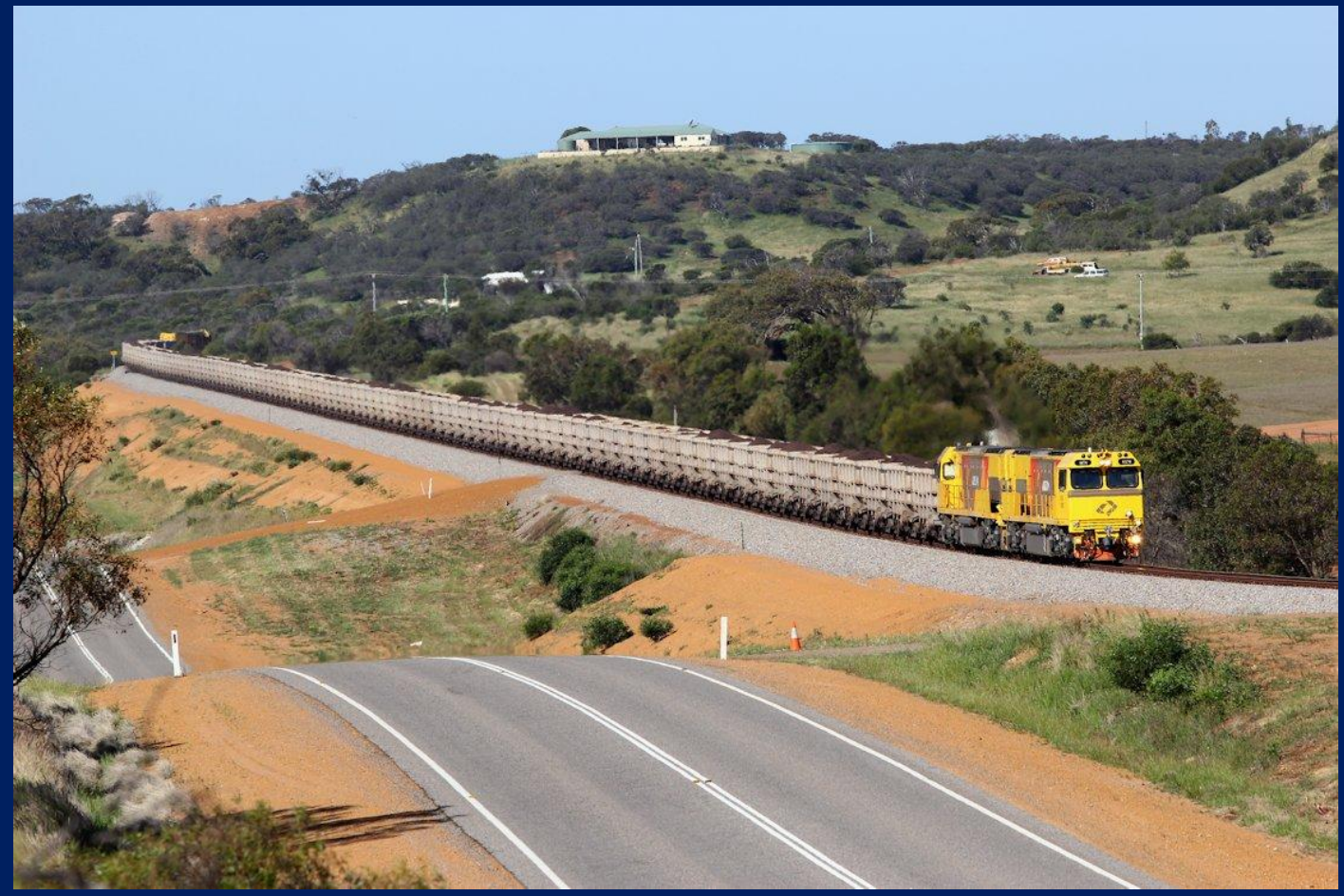
ACN4170 & ACN4169 DPU ACN4144 on loaded Karara ore at Bringo September 28th.