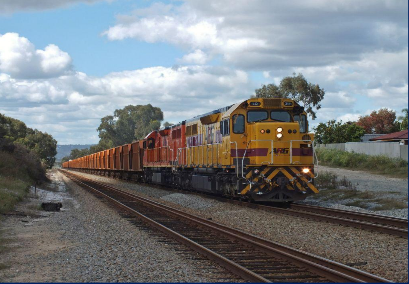
LQ3121 & LZ3109 on 2034 ore to Kwinana at Thornlie September 30th.