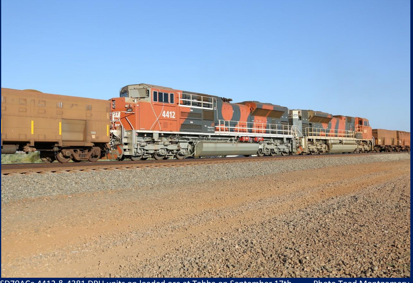
SD70ACe 4412 & 4381 DPU units on loaded ore at Tabba on September 17th.