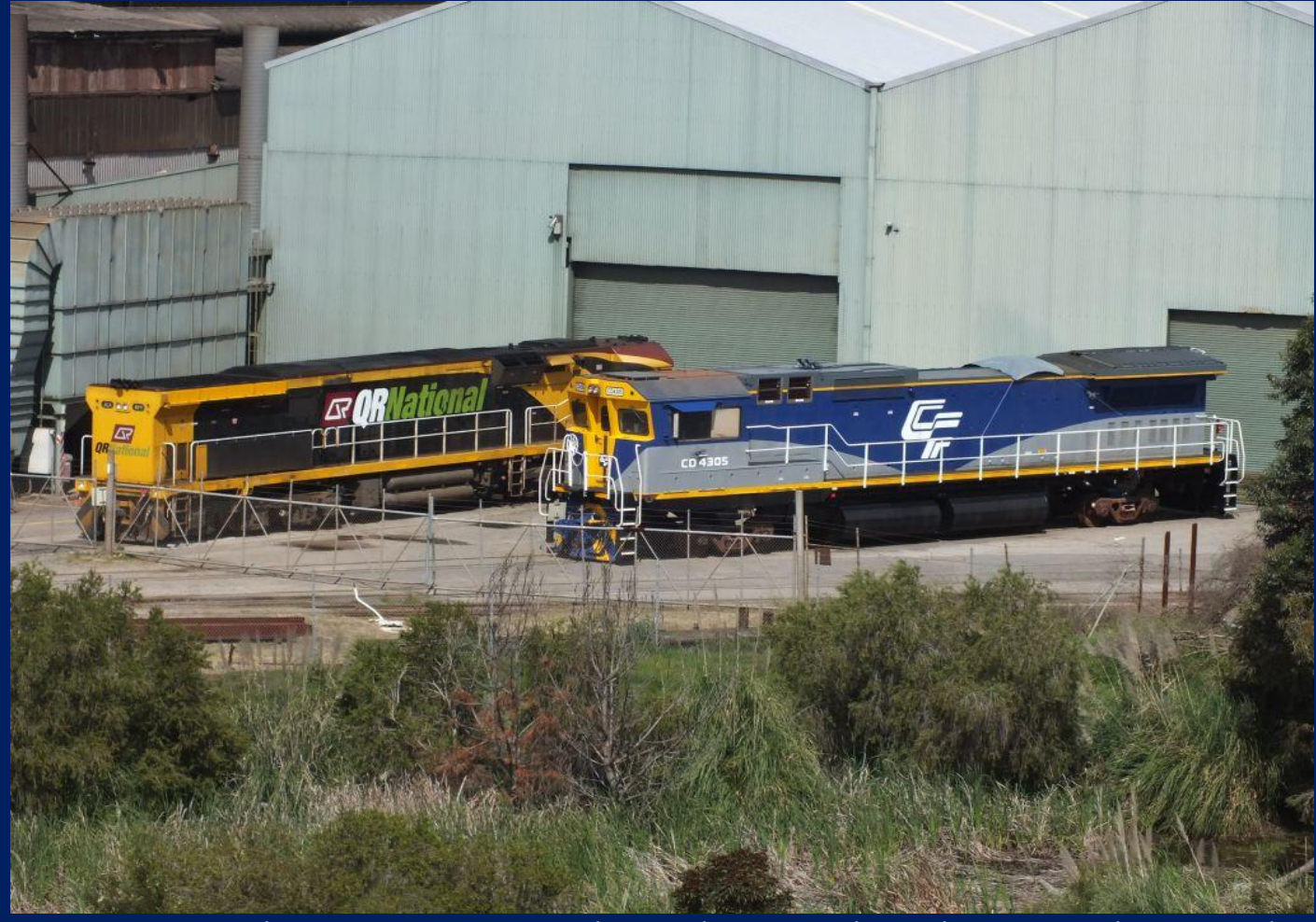
Aurizon ACA6011 and CFCLA CD4305 in UGL yard Bassendean September 15th.