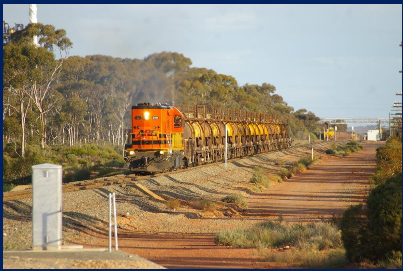
L3110 on 6410 acid tankers departing Hampton with ore train waiting line clear 19/9.