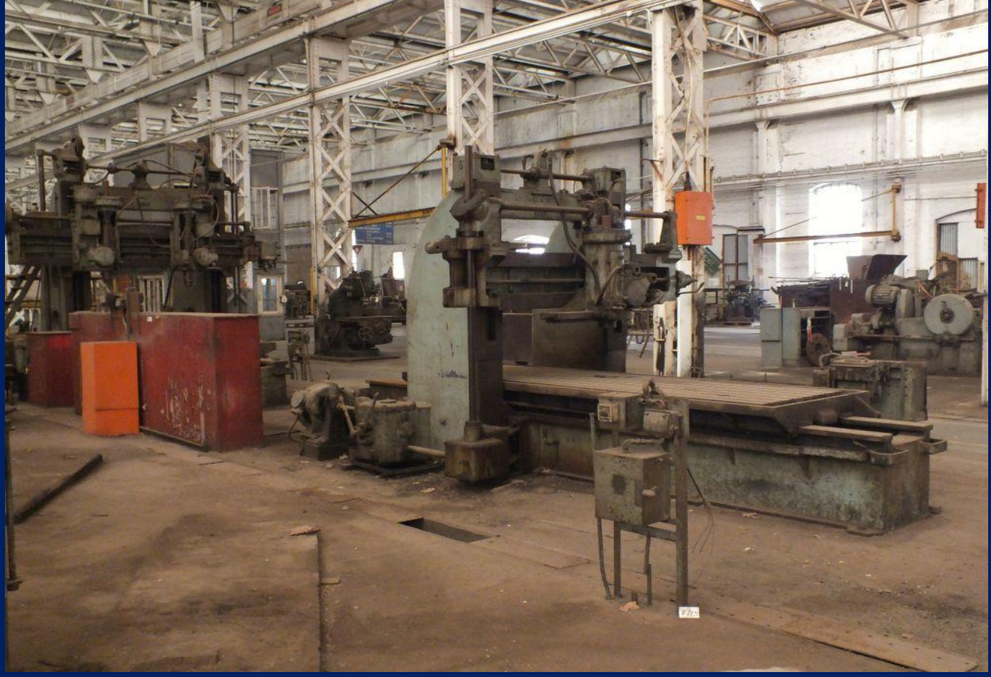
Machinery still in Locomotive and Railcar overhaul shed at old Midland Workshops 8/9.