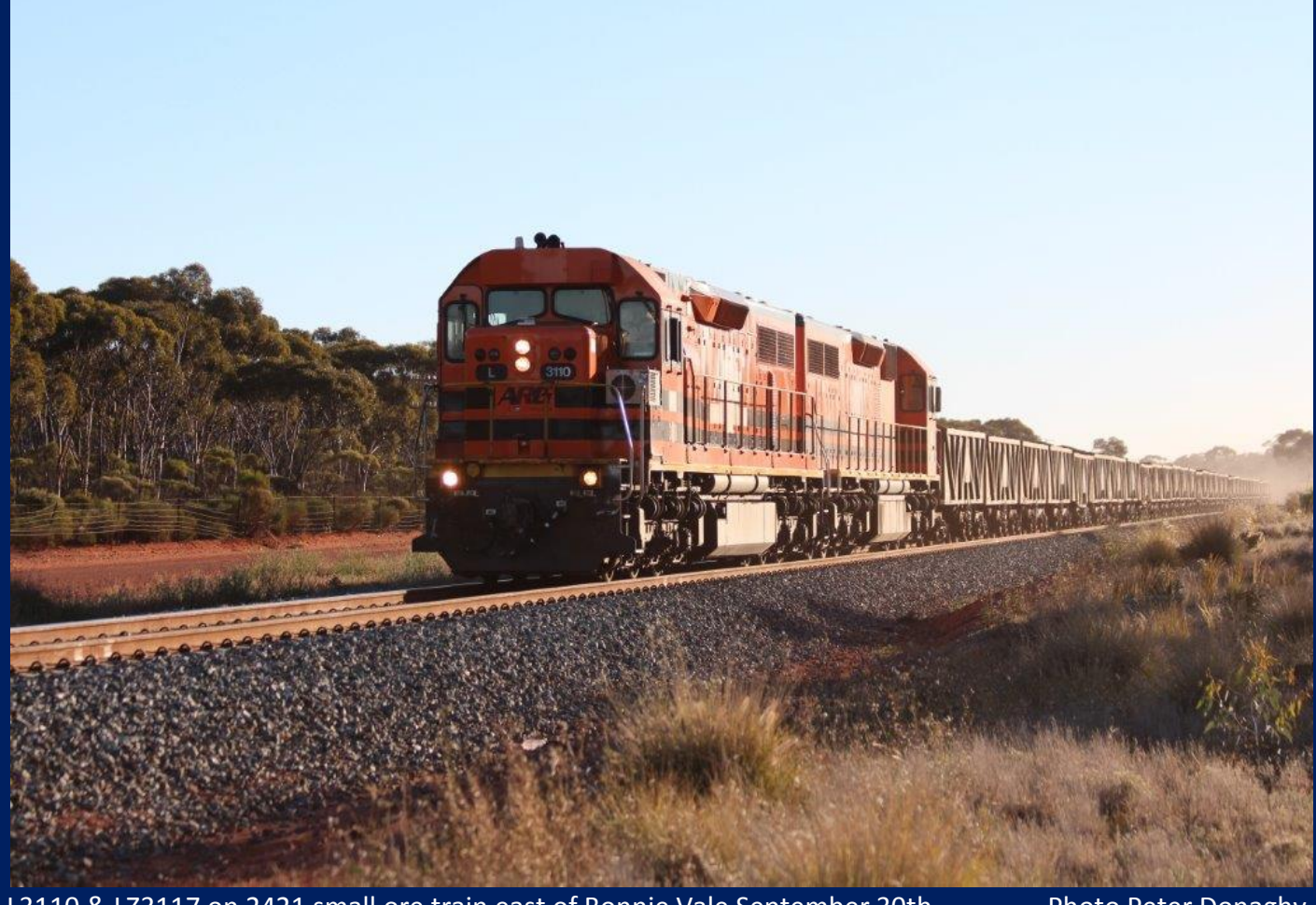
L3110 & LZ3117 on 2421 small ore train east of Bonnie Vale September 30th.