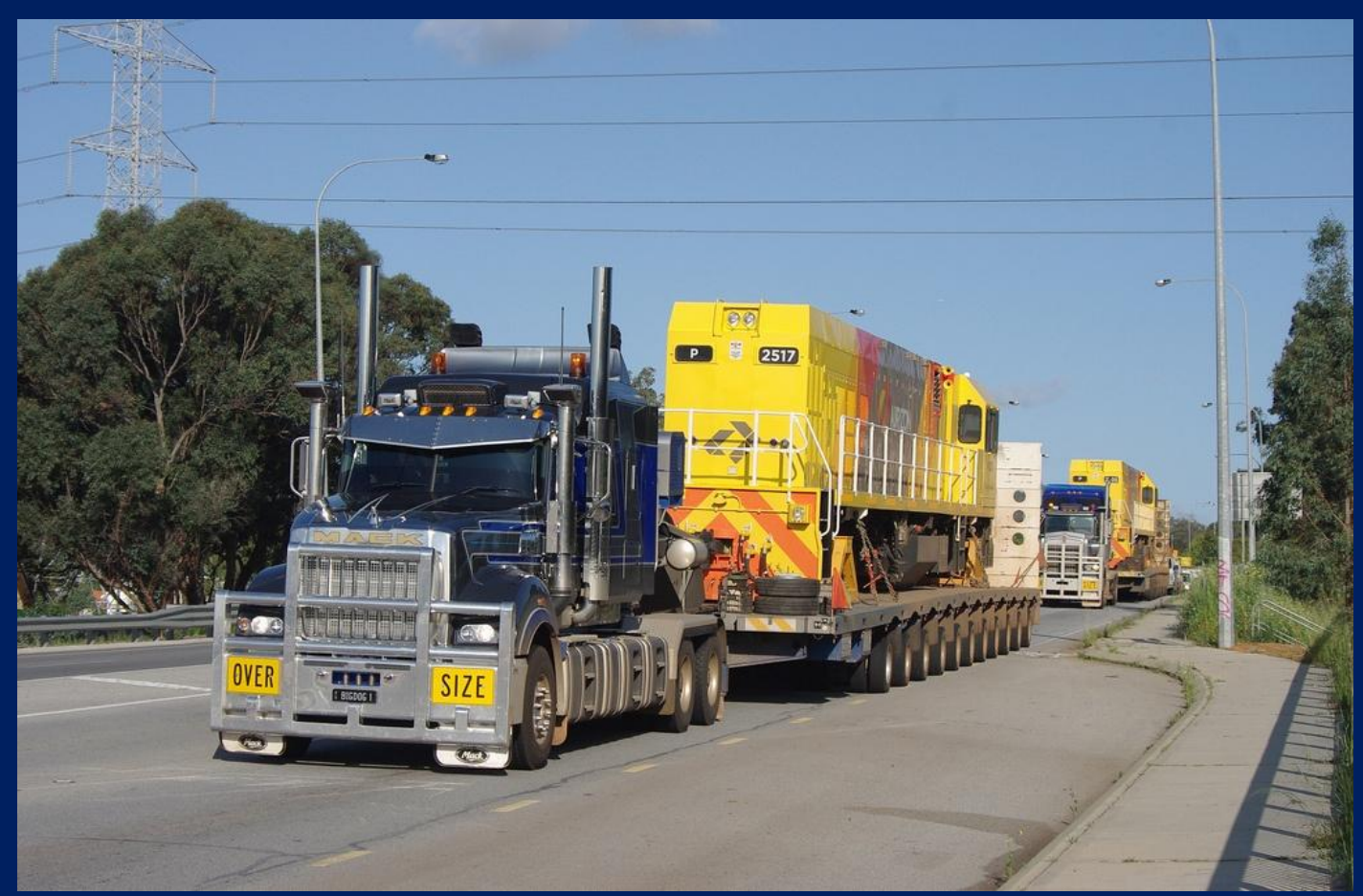
P2517 & P2505 on transport floats at Greenmount on way to Forrestfield 15/09.