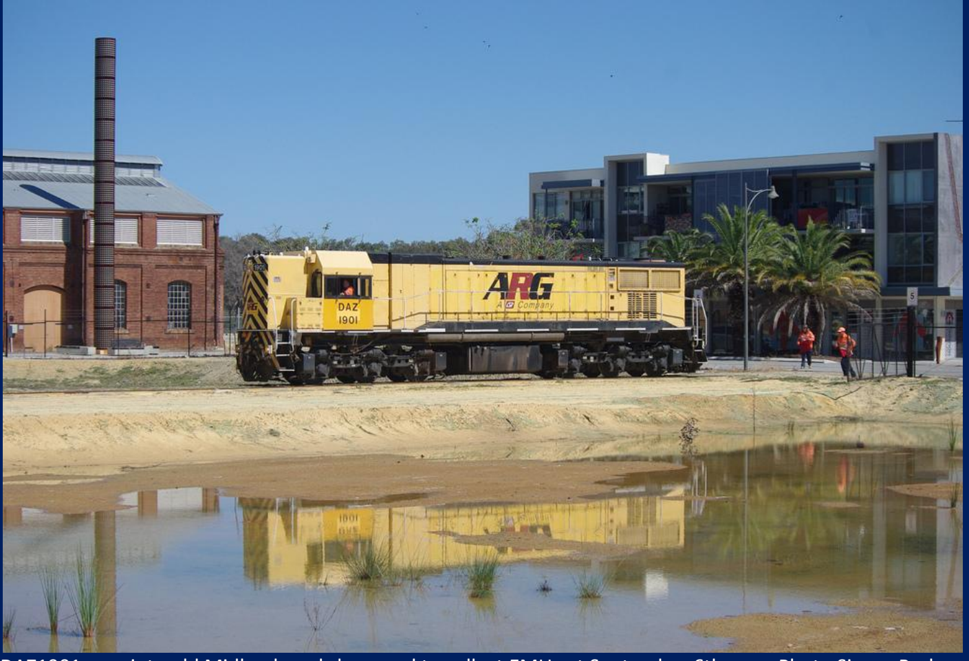
DAZ1901 runs into old Midland workshop yard to collect EMU set September 6th.