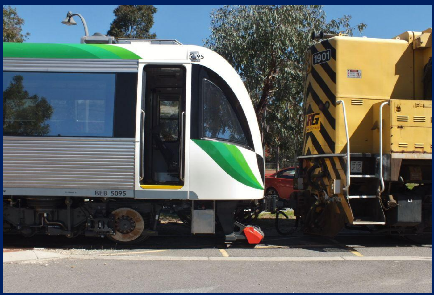
DAZ1901 and BEB5095 cab to passing thru car park to access main line at Midland 6/09.