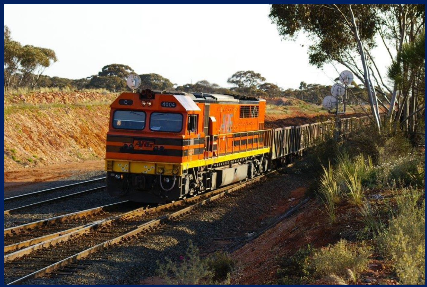
Q4004 on 2421 short ore about to enter West Kalgoorlie Yards September 16th.