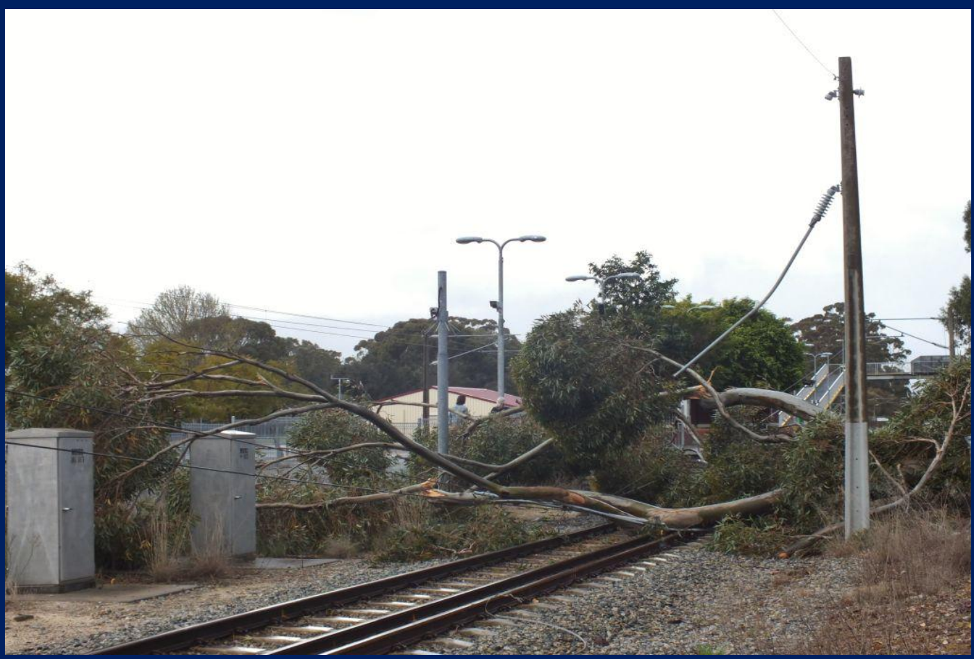
Tree fell over track at Guildford September 14th were no injuries but disrupted services.