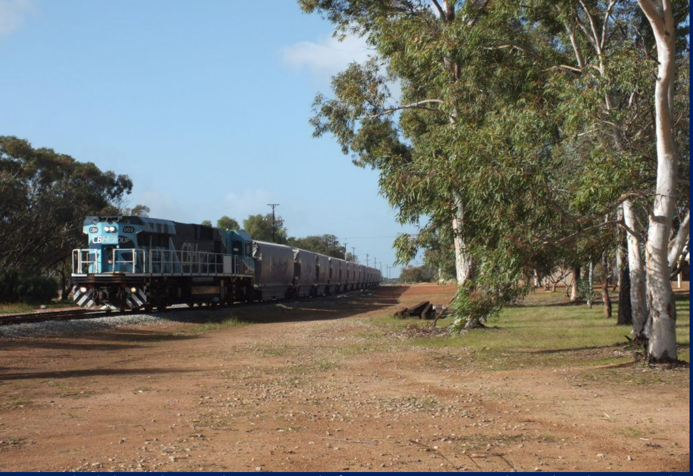
CBH003 on loaded grain departing loop Bruce Rock after crossing 4362 September 25th.