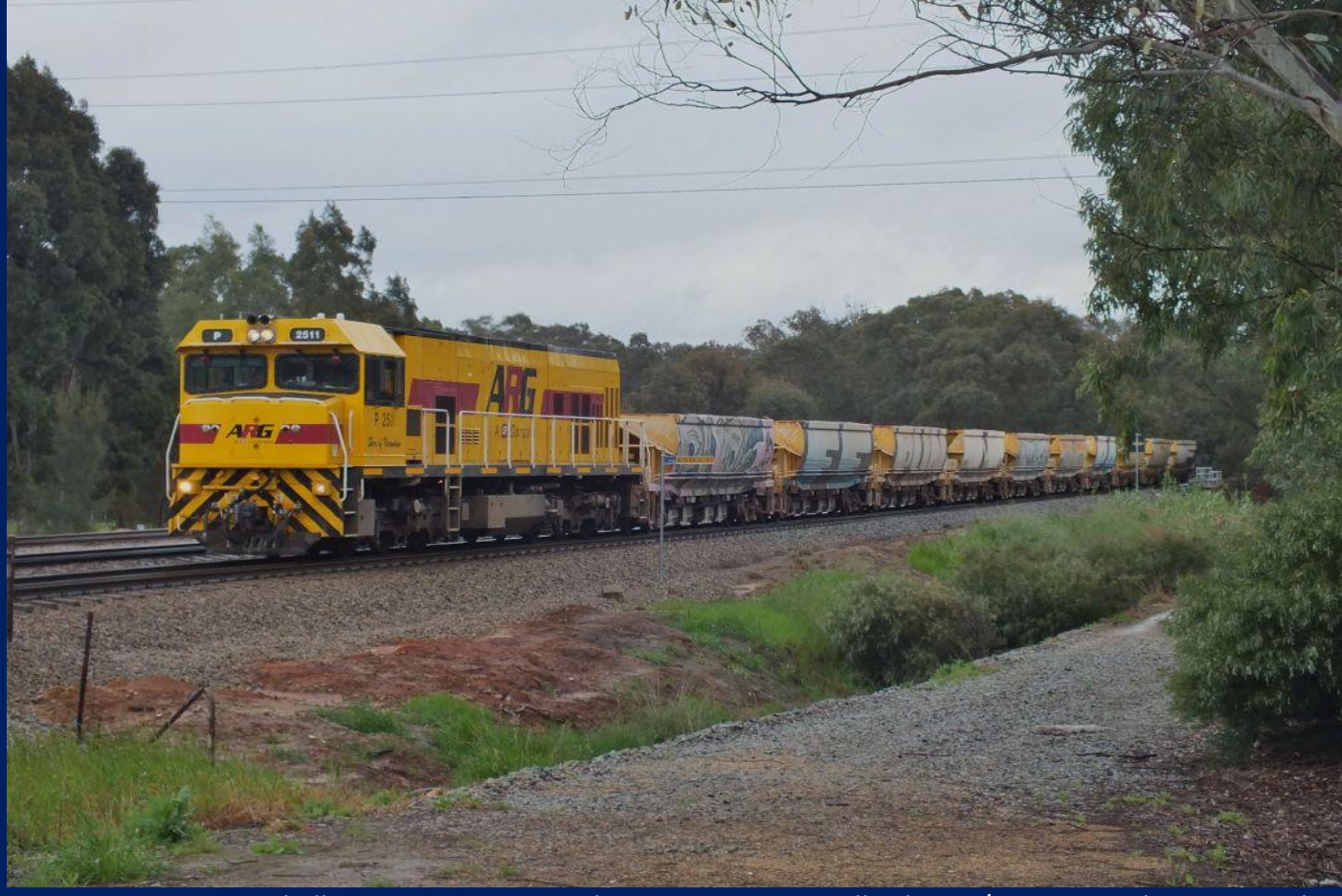
P2511 on 6376 empty ballast wagons Avon Yard to Kwinana at Woodbridge 20/09.