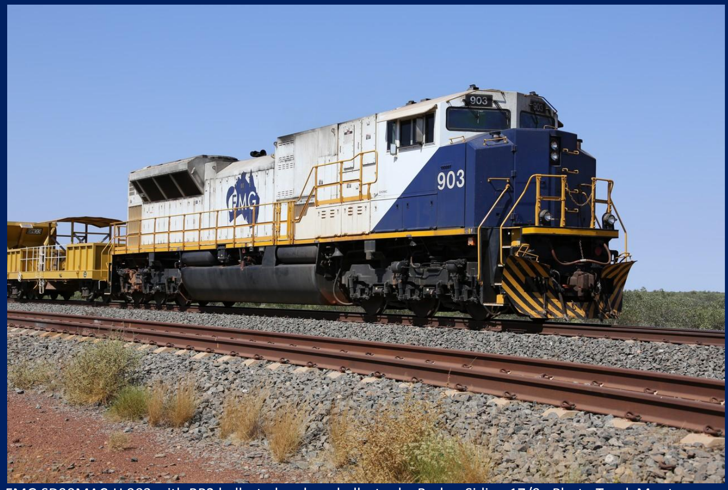
FMG SD90MAC-H 903 with BP2 ballast plough on ballast rake Barker Siding 17/9.

Aurizon hauled most of the stored narrow gauge grain wagons out of West Merredin running a special empty wagon movement via Bruce Rock, Corrigin to Narrogin then onto Avon Yard. B series EMUs again ran on Thornlie services during week of Royal Show at end of September and into October. Aurizon continued to send ACA locomotives to UGL Bassendean for workshop attention during month. The rake of Karara Mining wagons that had been loading at Mt Gibson Perenjori loader was discontinued and the rake is now loaded at Tilley Siding Morawa and worked by ACN as now runs only on heavy track. Three locomotives on Mondays container train to North Port again occurred during month.