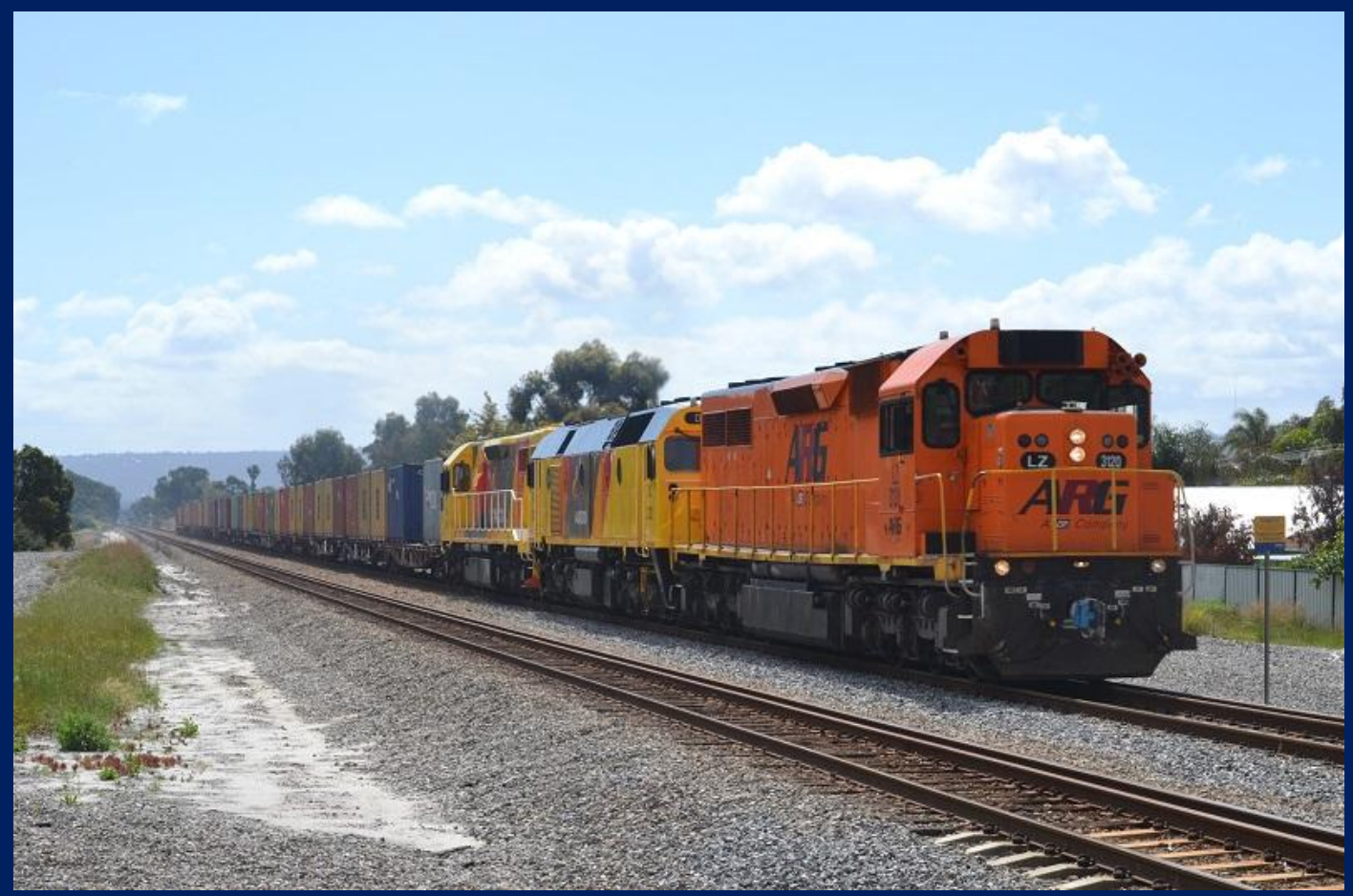
LZ3120, DC2205 & LZ3106 on 2196 container train Thornlie September 30th.