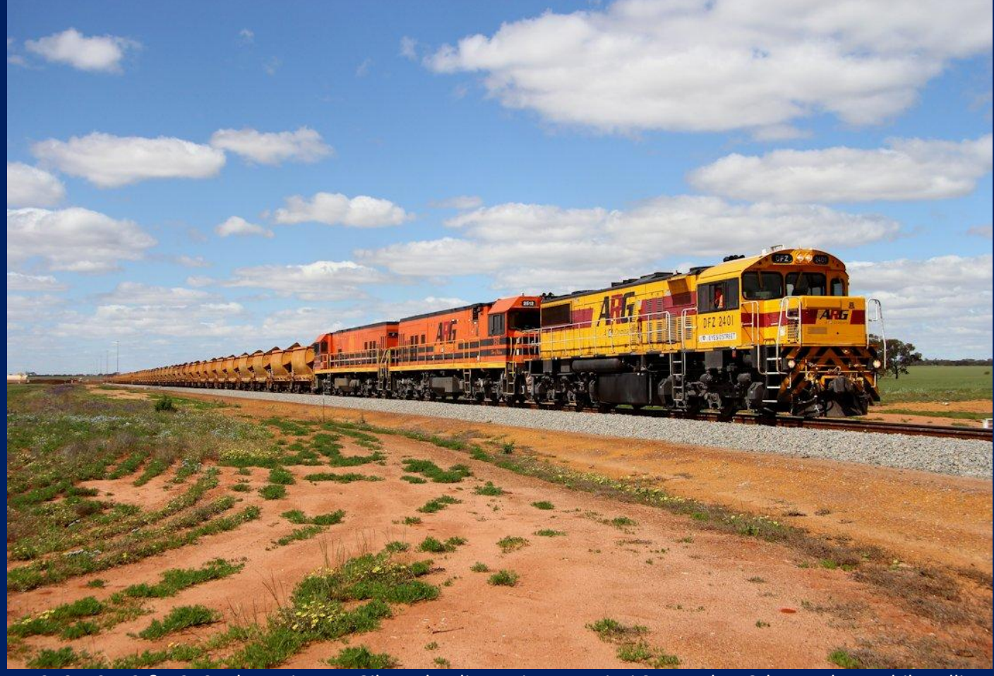
DFZ2401, 2512 & P2507 departing Mt Gibson loading point Perenjori September 8th.