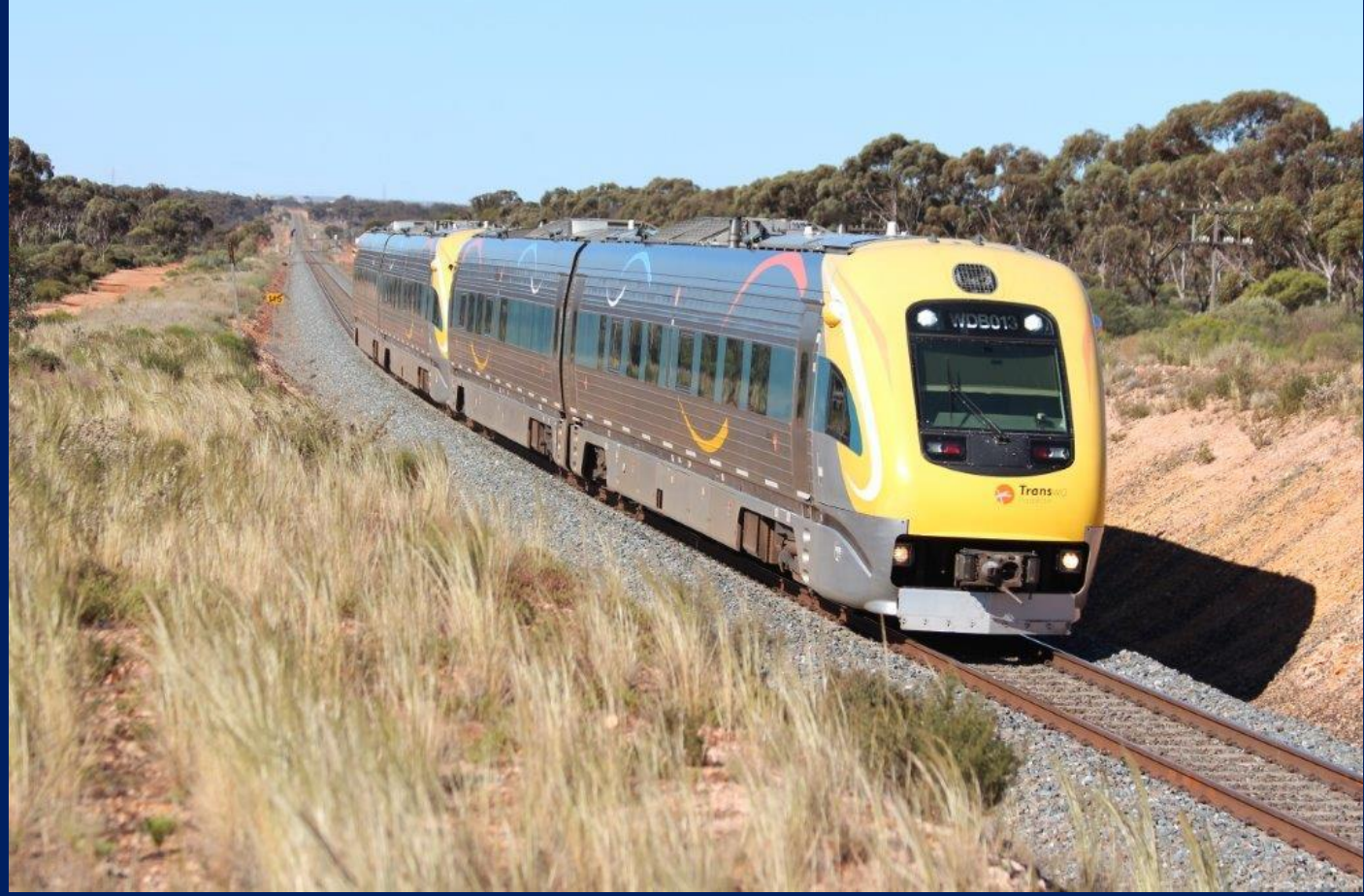
2486 four car Prospector set climbing out of Binduli on its run to Perth 30/09.