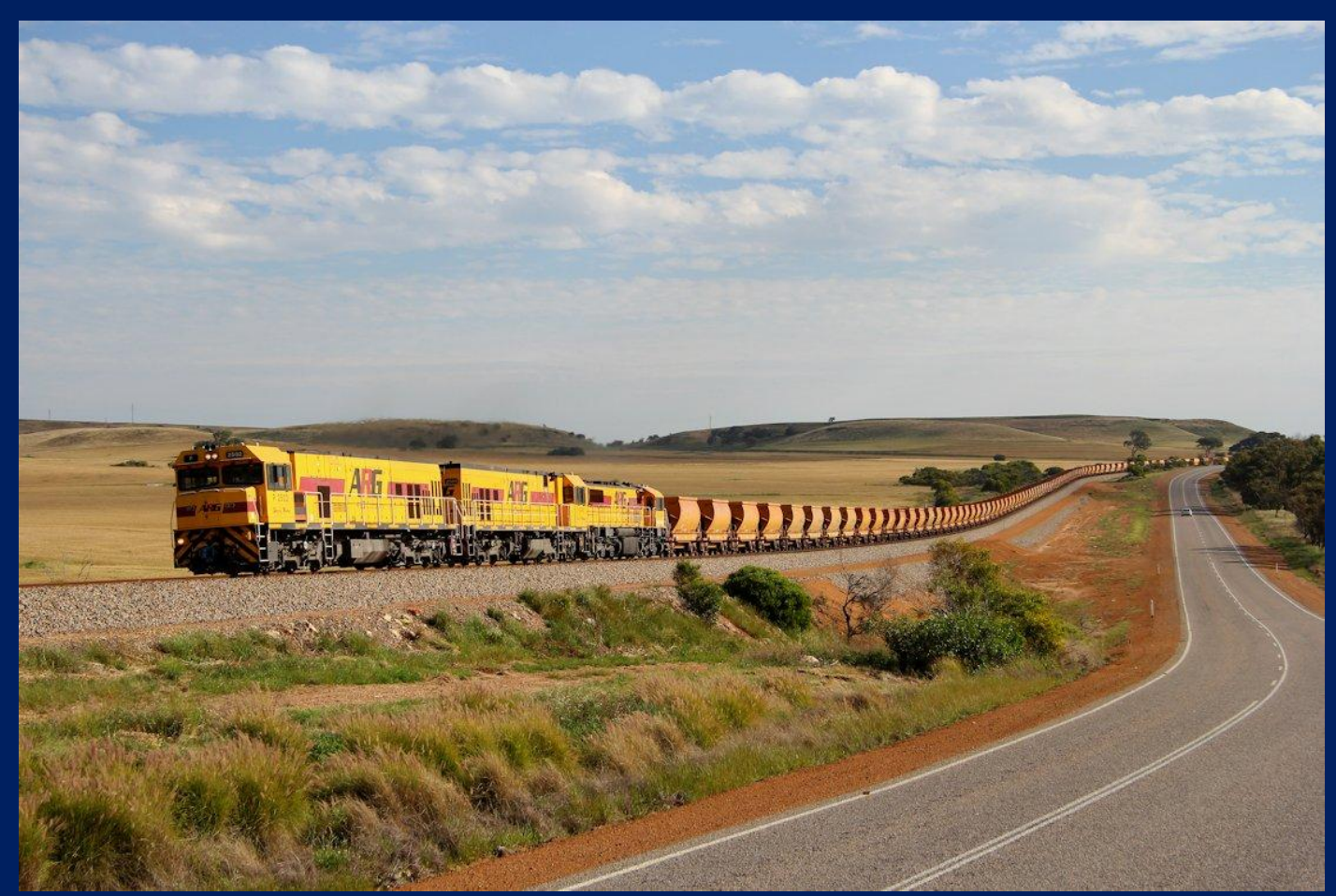
P2502, P2501 & DFZ2401 on empty Mt Gibson ore train to Perenjori at Grants 29/09.