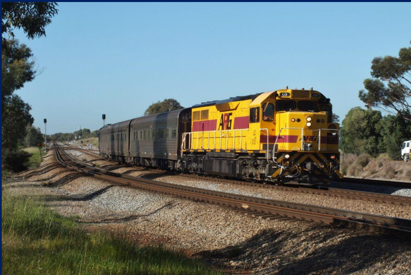
LQ3121 on 5RC1 AK inspection cars Forrestfield to Kalgoorlie at Woodbridge 10/10.