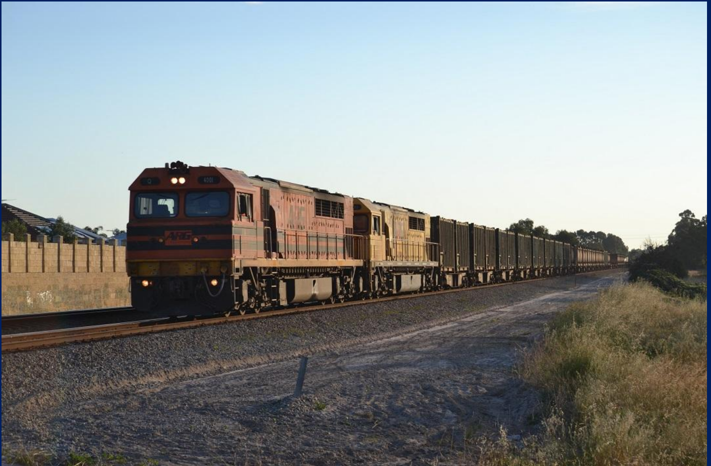
Q4001 & Q4011 on 1029 sulphur Kwinana to Malcolm at Thornlie October 29th.