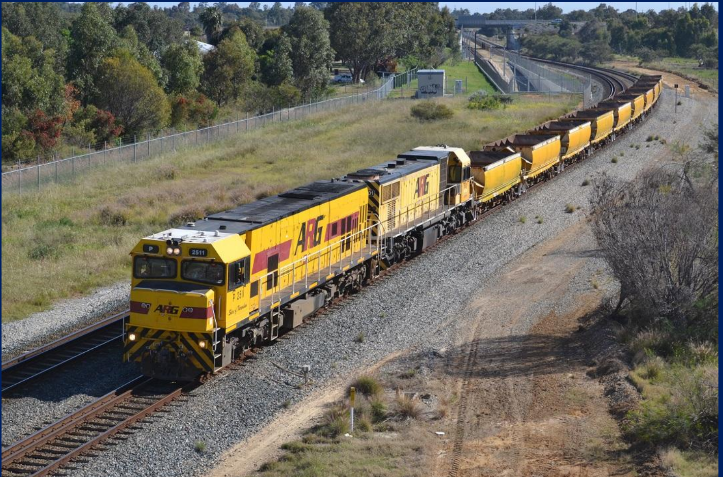
P2511 & DAZ1901 on 5275 empty ballast Kwinana to Avon at Kenwick 17/10.