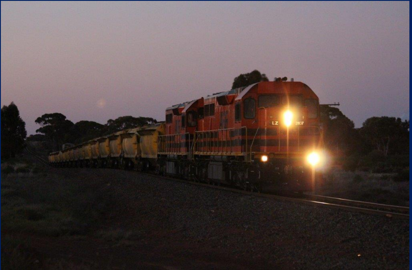
LZ3107 & L3110 on 7478 nickel at dusk approaching Kalgoorlie October 12th.