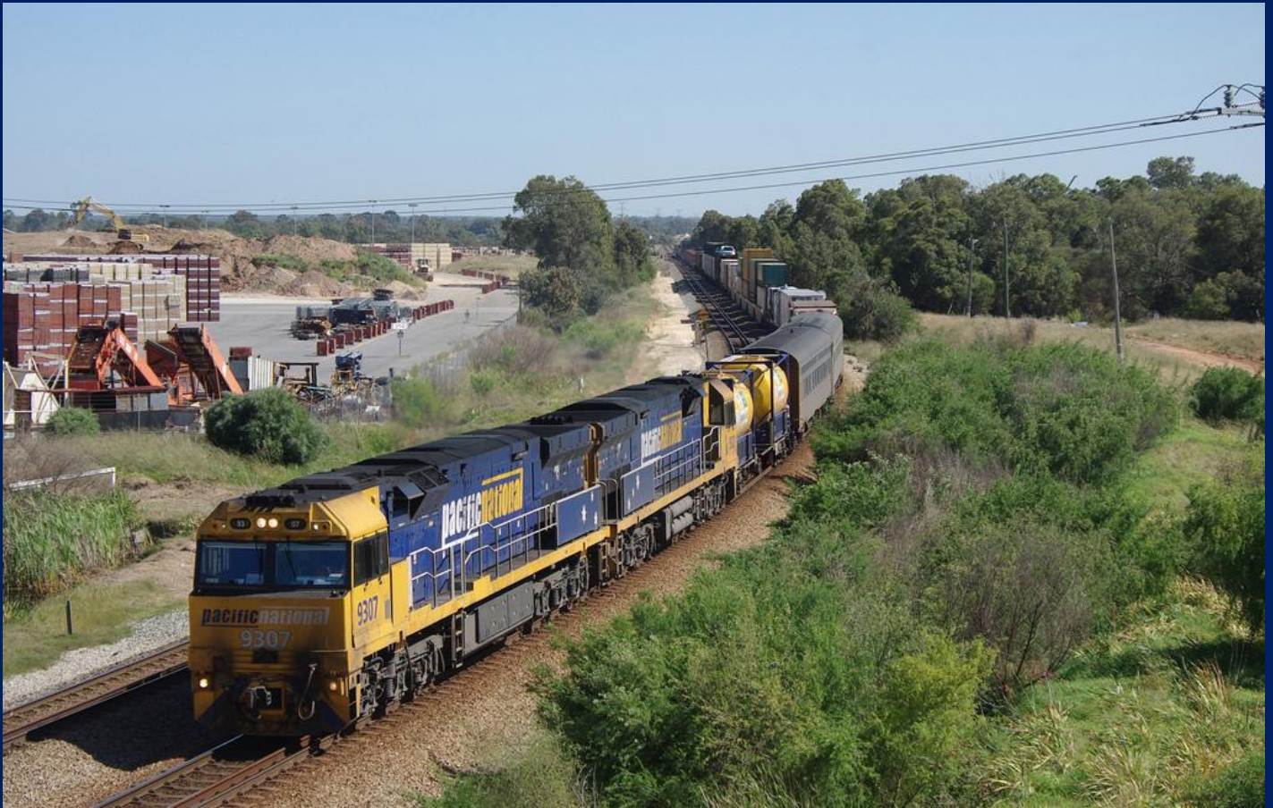
9307 & 9302 on 1MP5 with inline fuel tankers and two crew cars South Guildford 30/10.