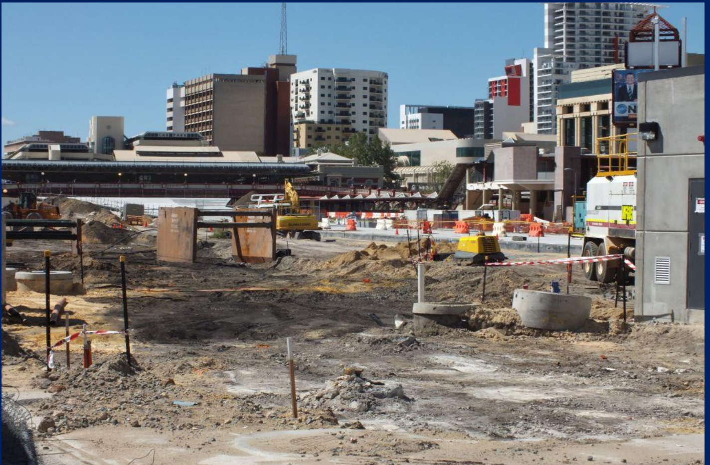
Location of Perth carriage sheds, storage sidings, Fremantle line being redeveloped 13/10.