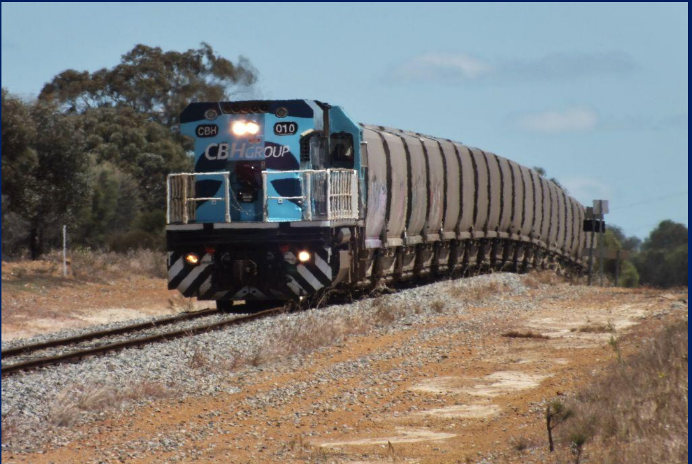
CBH010 on empty grain crests grade at Yilliminning yard limit October 23rd.