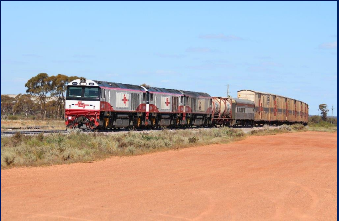
SCT CSR003, CSR004 & CSR009 on 1MP9 at Parkeston on October 12th on first run of a CSR loco in WA.