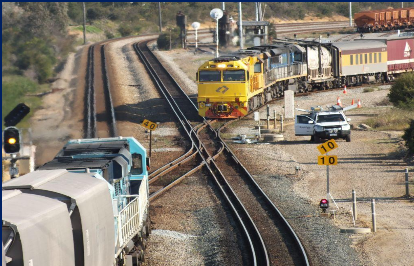
CBH120 & CBH119 cross 6021, LDP006 & LDP002 shunting Aurizon intermodal terminal Forrestfield 29/10.