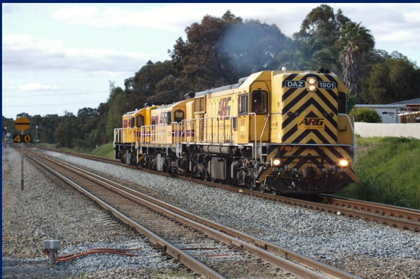
DAZ1901 hauls withdrawn AD1521 and AD1520 Forrestdfield for storage, Hazelmere 01/10.