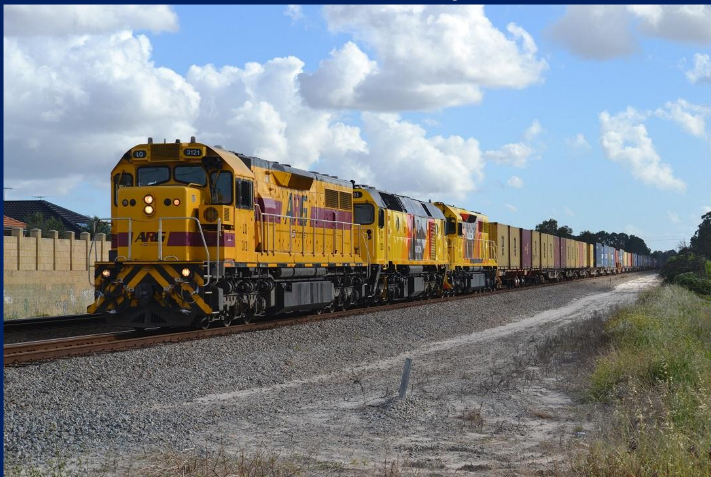
LQ3121, DC2205 & LZ3103 on 5195 container train at Thornlie October 9th.