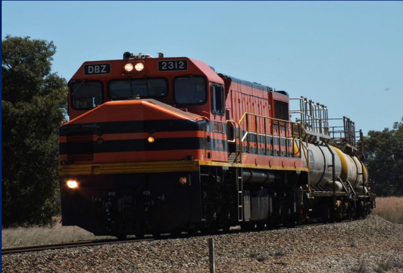
DBZ2312 on 3237 caustic tankers approaching Mundijong October 22nd.