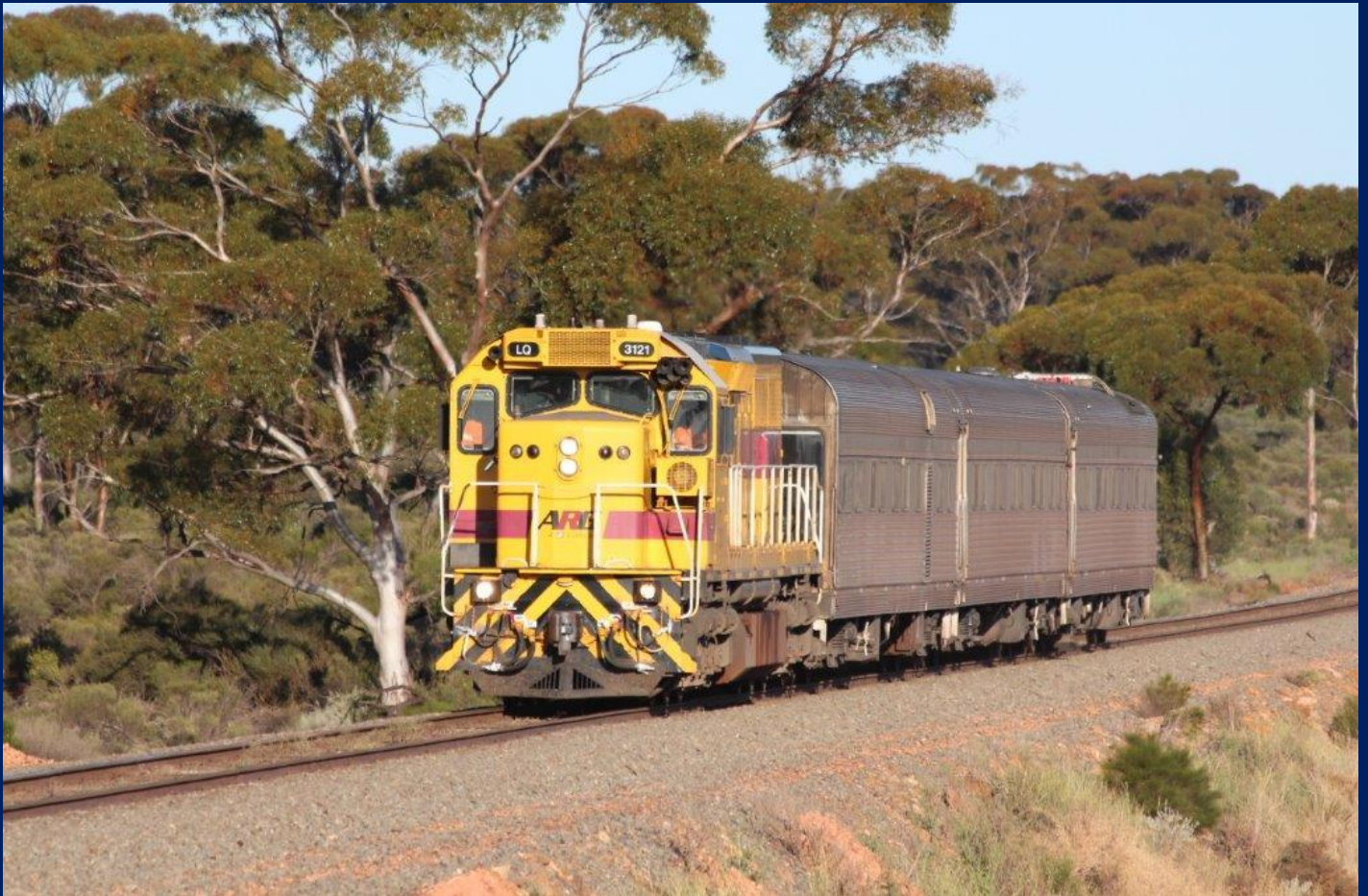
LQ3121 on AK inspection cars at 7km on Esperance line October 14th.