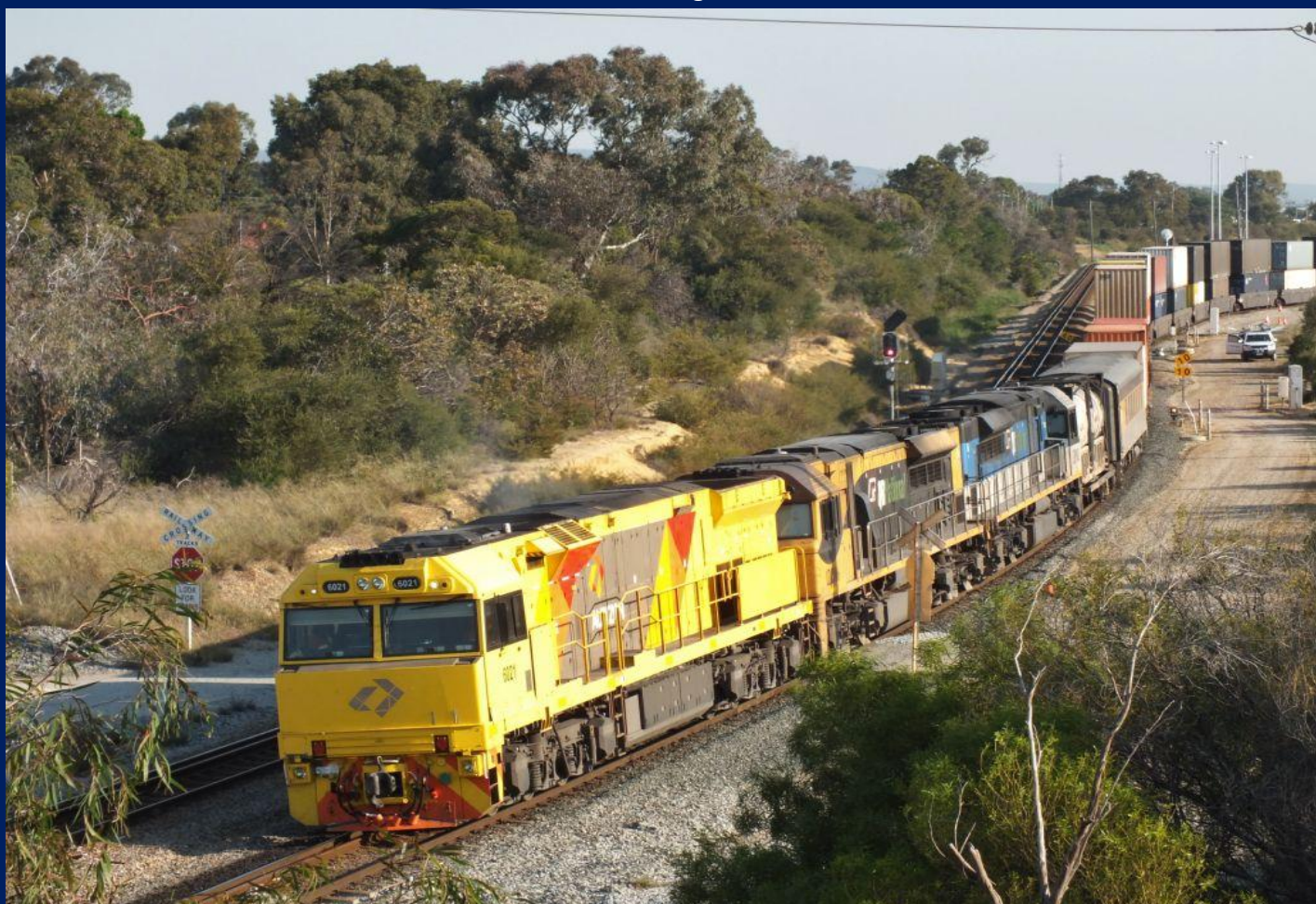
6021, LDP006 & LDP002 as #3 s/g shunter shunting out onto mainline 29/10.