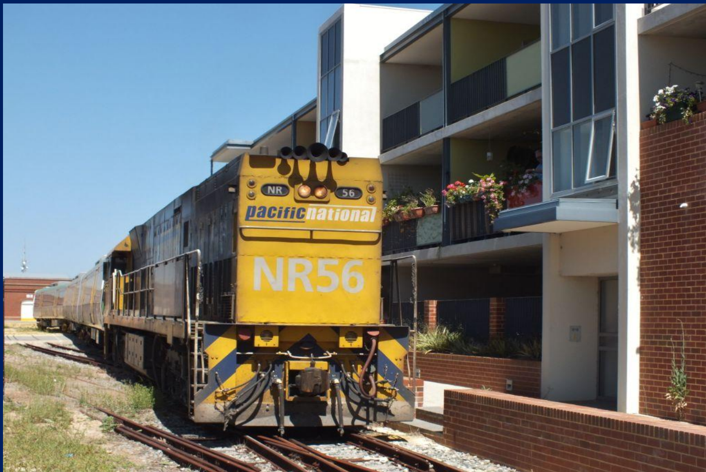
NR56 propels new EMU set 096 into old workshops Midland for bogie exchange 30/10.