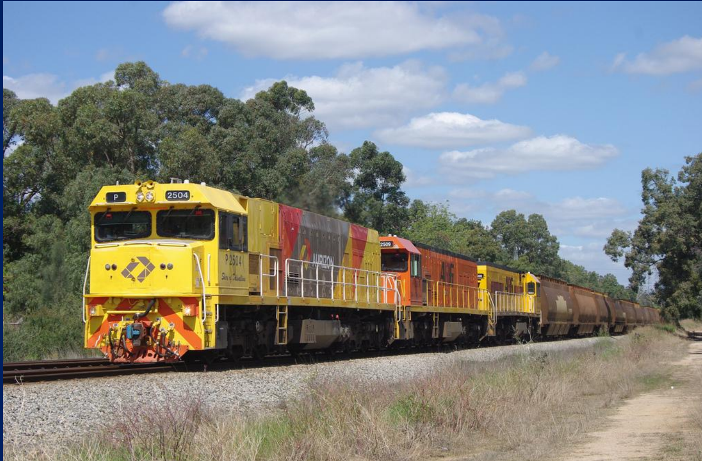
P2504, P2509 & P2508 on 3283 empty woodchip wagons to Avon at Swan View 01/10.