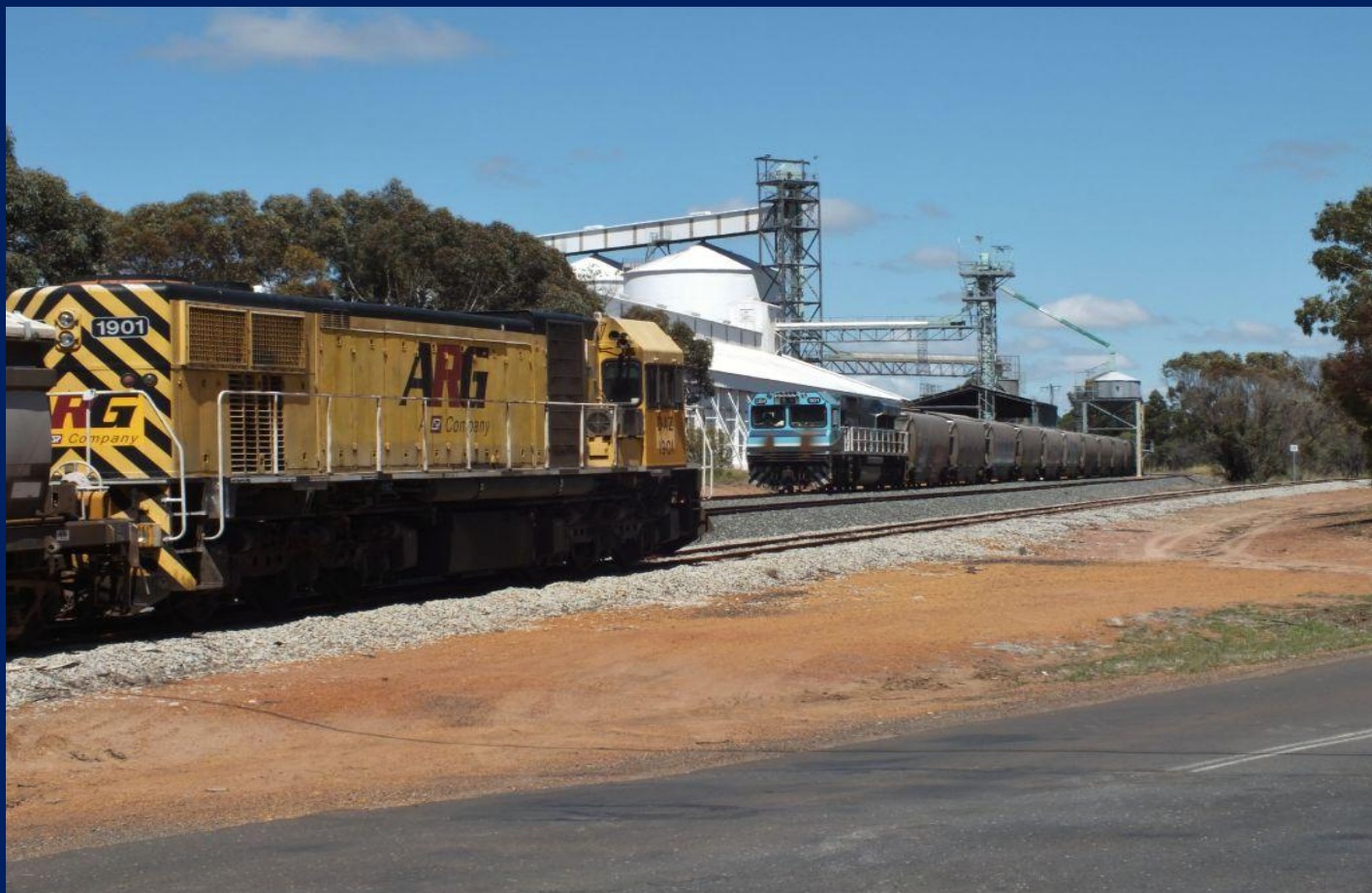
DAZ1901 on 4362 crosses CBH001 loading at Wickepin CBH October 23rd.