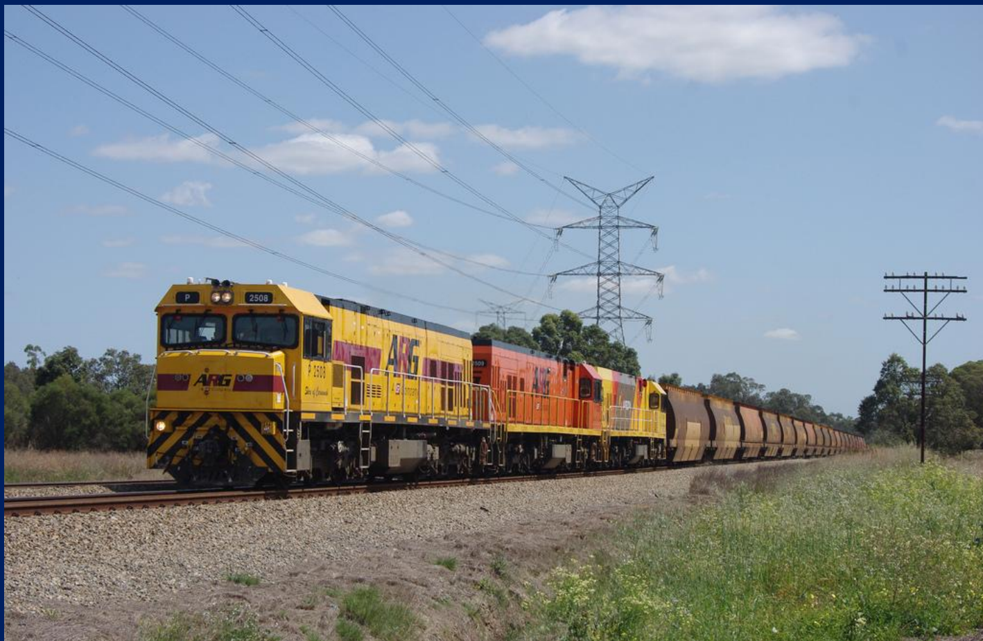
P2508, P2509 & P2504 on 6476 empty woodchip wagon movement at Stratton 01/10.