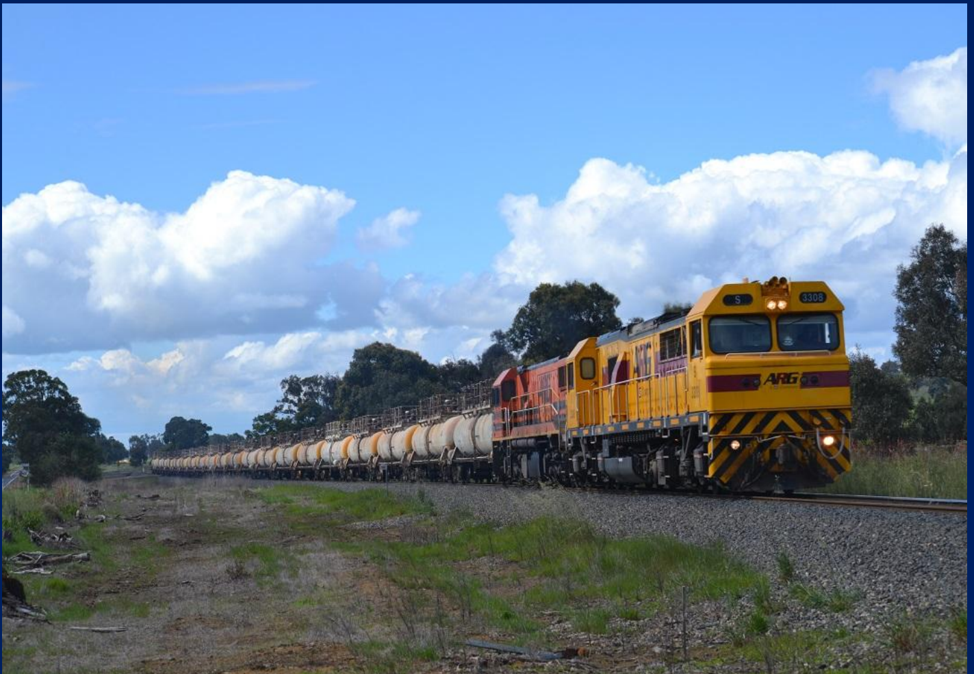
S3308 & DBZ2313 on 1852 caustic tankers at Roelands October 20th.