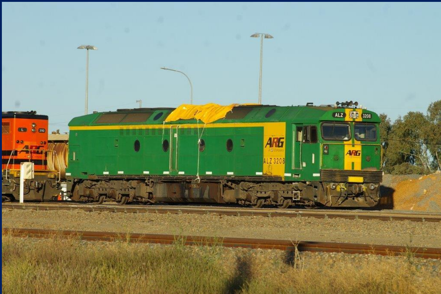
ALZ3208 withdrawn from service, stored exhaust covered at West Kalgoorlie 25/09.