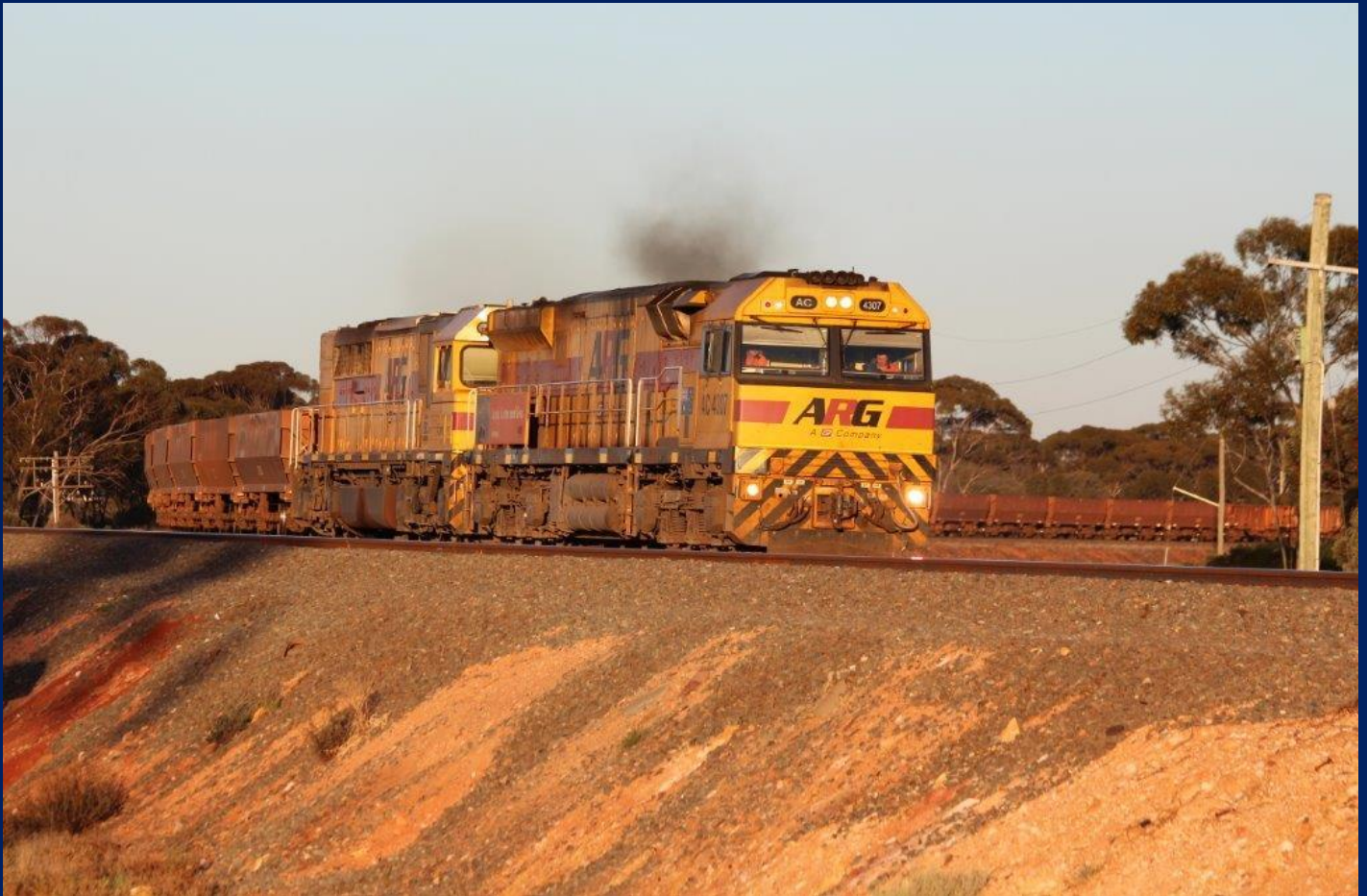
AC4307 & Q4010 on 5416 empty ore rounding the curve at Binduli October 17th.