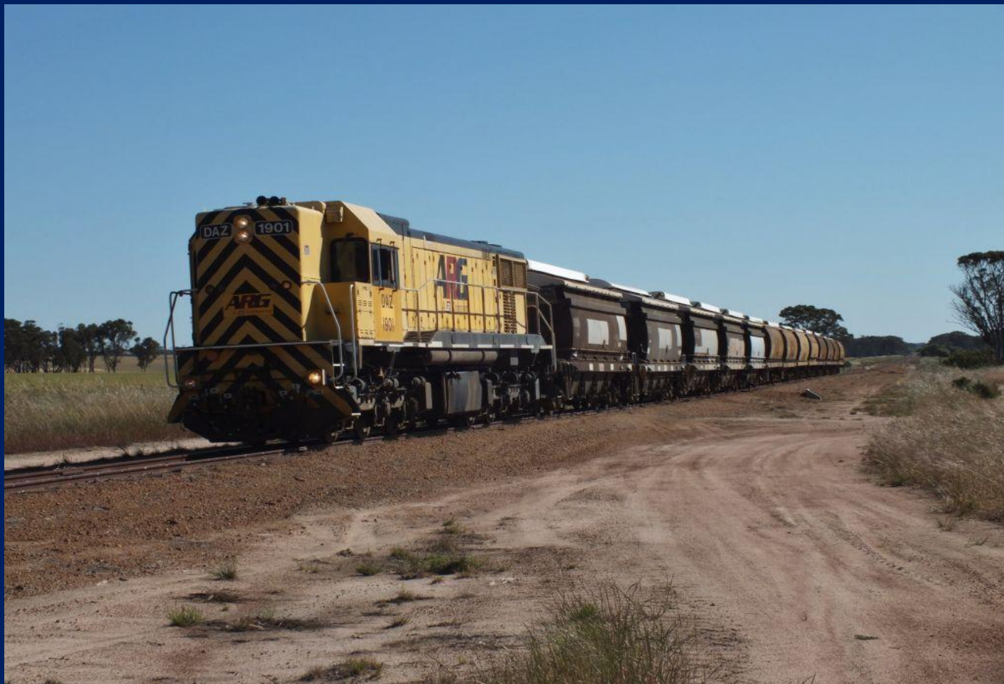
DAZ1901 on 4362 empty wagon movement West Merredin Avon near Bullaring 23/10.