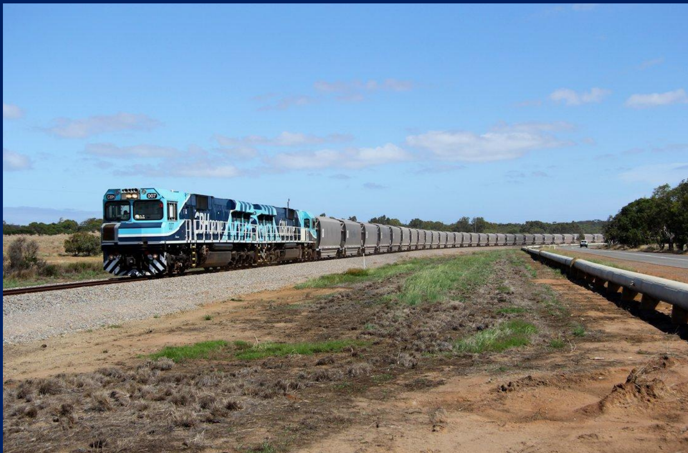
CBH007 & CBH008 on empty grain to Mingenew just south Narngulu October 26th.