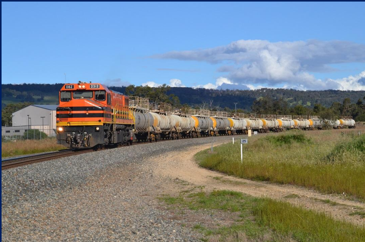
DBZ2312 on 1238 empty caustic tankers at Mundijong October 20th.