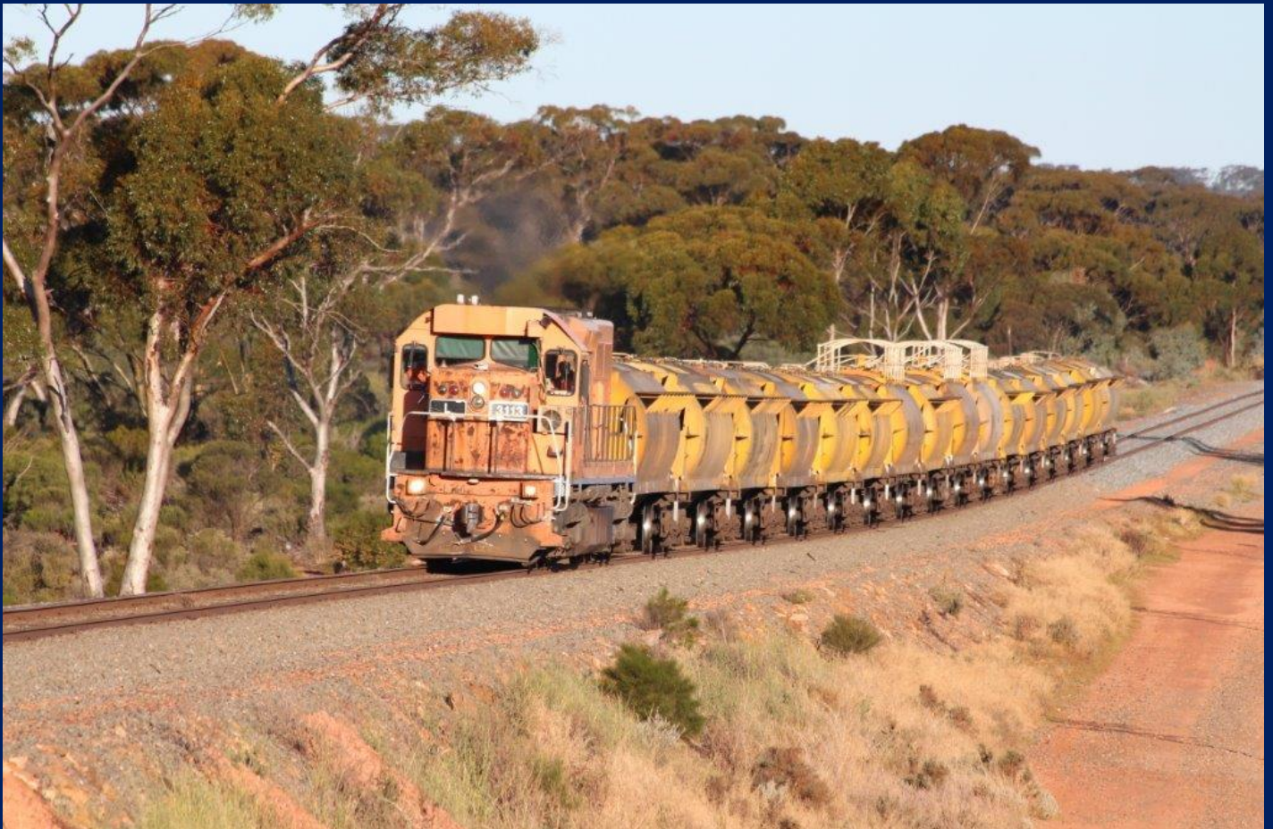
L3113 on 4438 empty nickel from Hampton at West Kalgoorlie October 23rd.