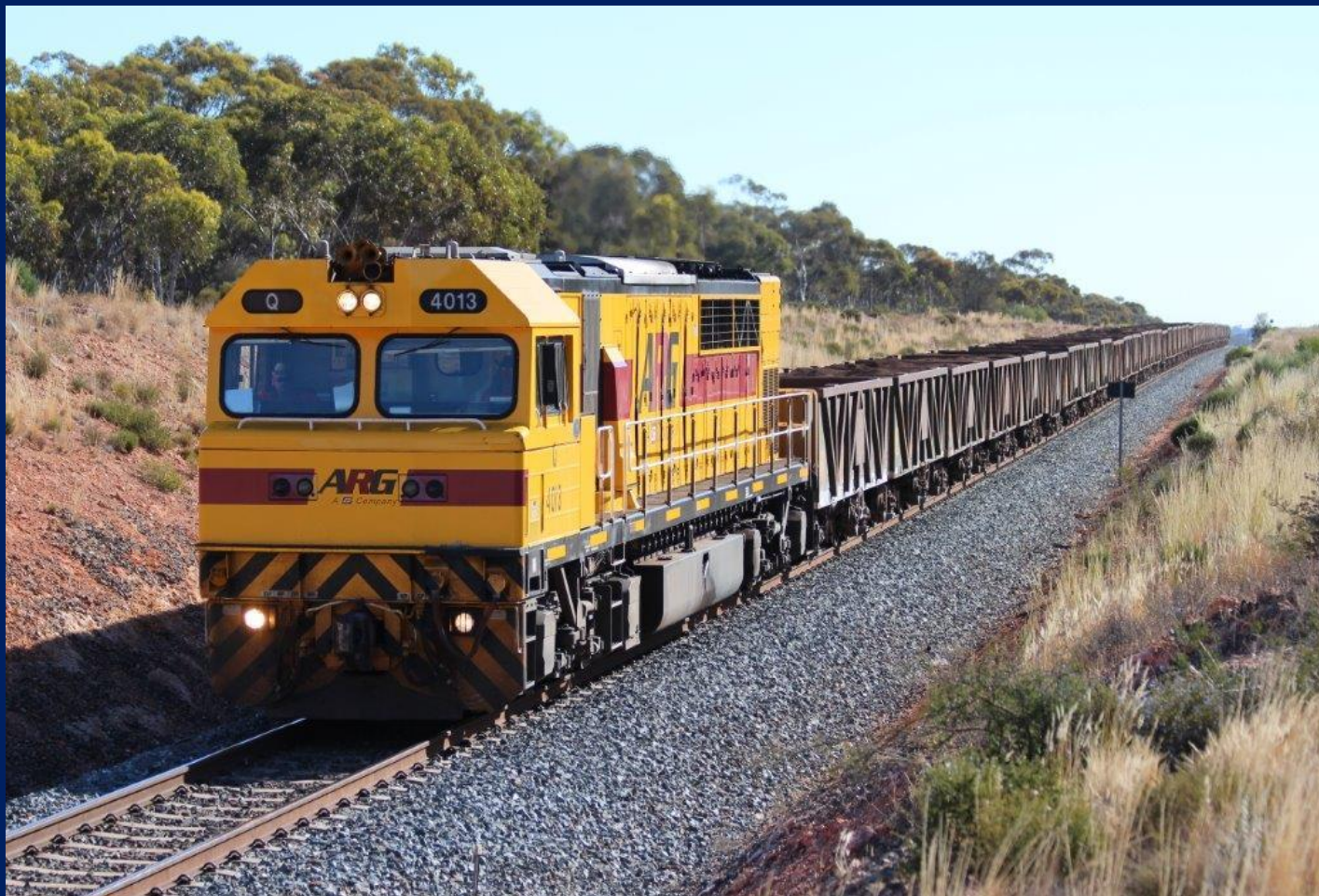
Q4013 on 2421 small ore cresting grade at 644km on EGR approaching Binduli 28/10.