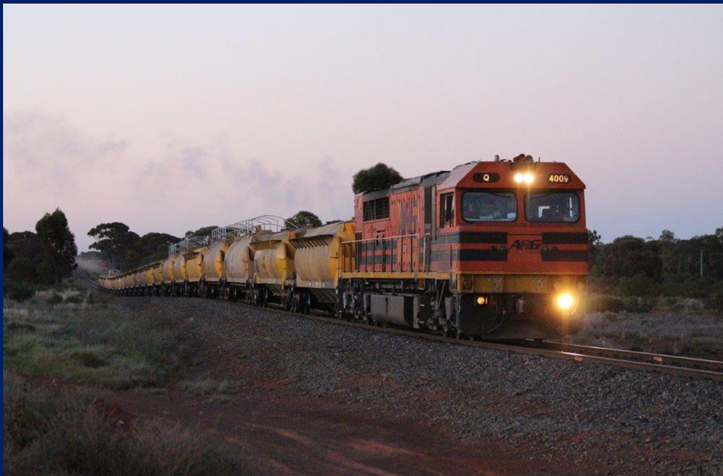
Q4009 on 1478 nickel from Leonora on the outskirts of Kalgoorlie October 13th.