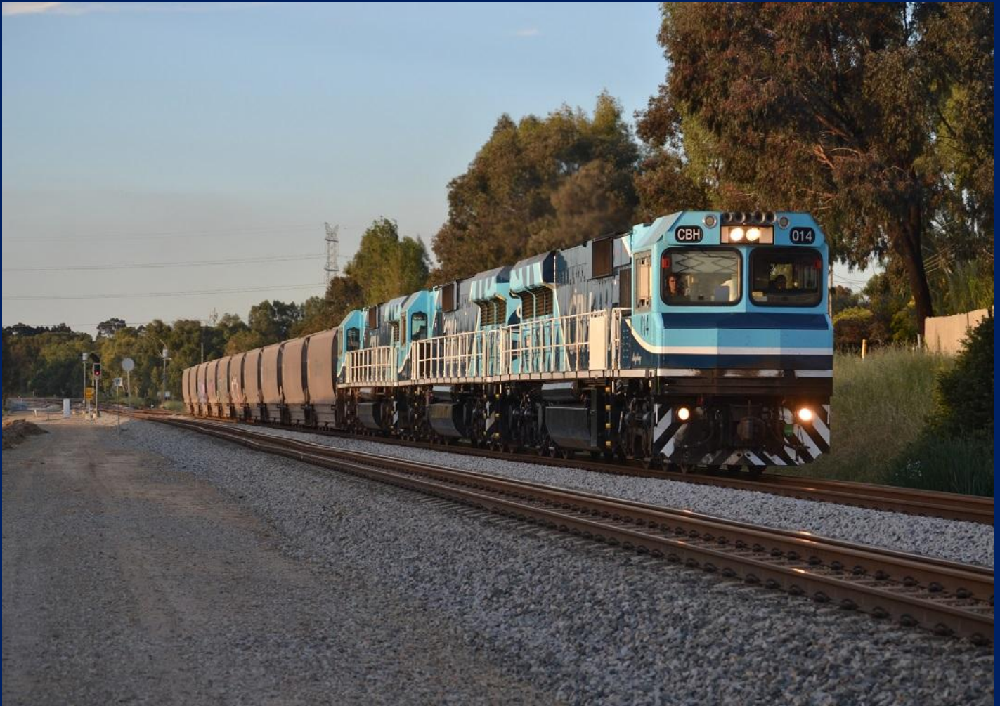
CBH014, CBH017 & CBH010 on 1K02 with ten wagons from Mawson derailment on Quairading line, Avon to Kwinana CBH terminal climbing grade through Hazelmere October 13th.

Following Mawson derailment on Quairading line and subsequent wagon recovery, services were suspended on this Tier3 line and was closed from October 31st owing to its poor condition. West Merredin Trayning line Tier3 line that had not seen any traffic since August then only to Nungarin CBH bin was also closed at same time owing to its poor condition. Services will remain on rest of the Tier3 lines till end of June 2014 while CBH and Brookfield Rail continue negotiations as to their long term future. SCT ran three CSR locomotives on 5MP9/1PM9 service to Forrestfield on October 13th the first time these units have run in WA. The final two SD70ACe units for FMG 720 and 721 arrived at Port Hedland October 27th. EMU set 096 arrived from builders in Qld October 29th.