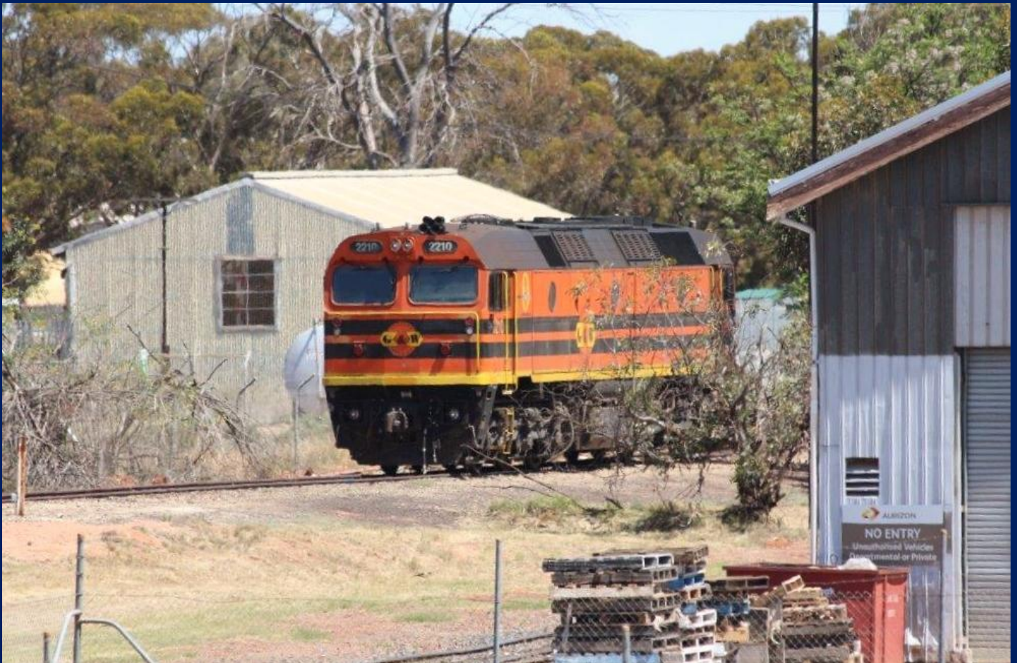
G&W 2210 stabled at Kalgoorlie loco 12/10 waiting to work AK cars back east.