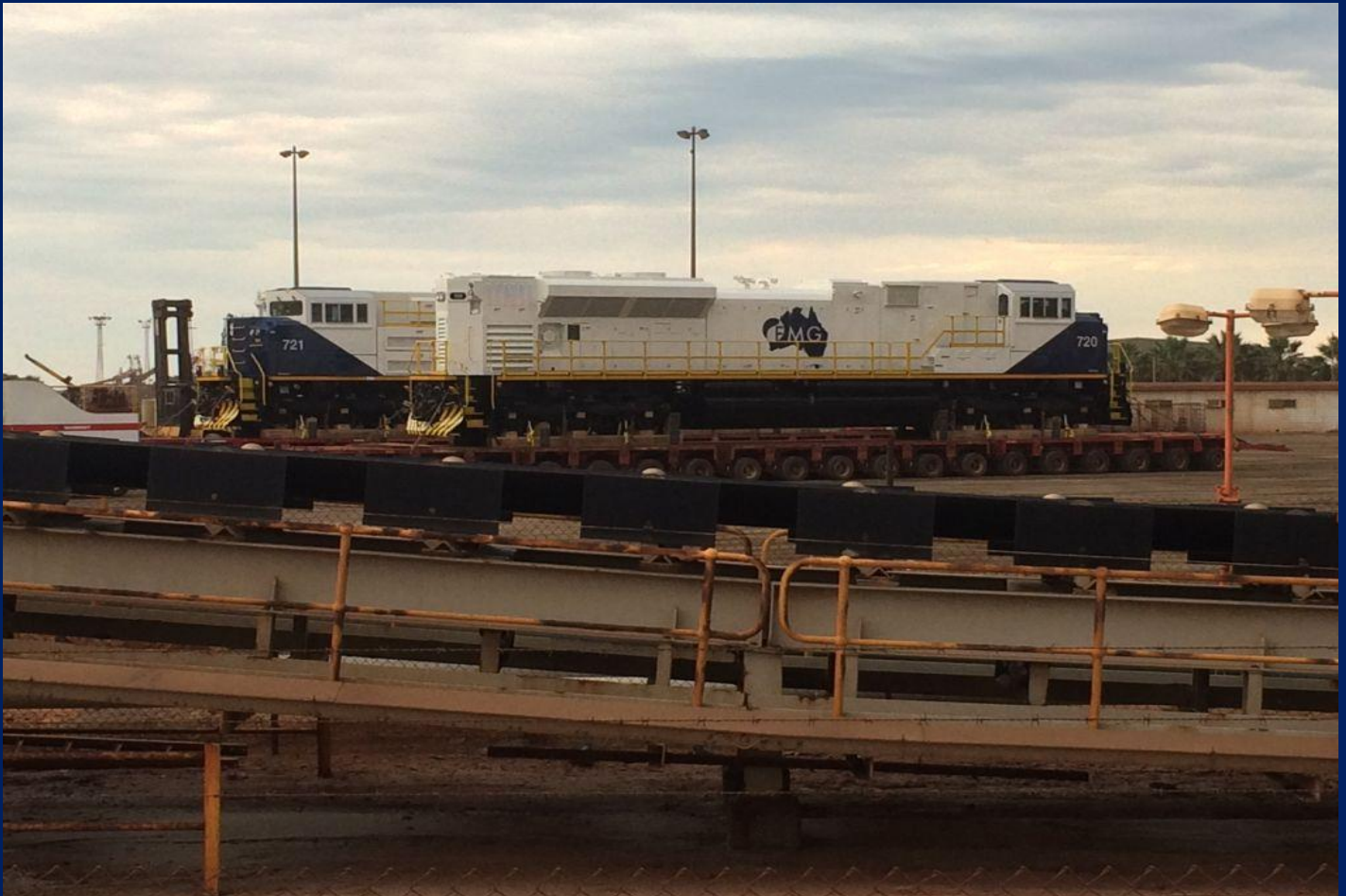
New FMG SD70ACE 720 and 721 on transport floats Port Hedland wharf 27/10. Photo Toad Montgomery