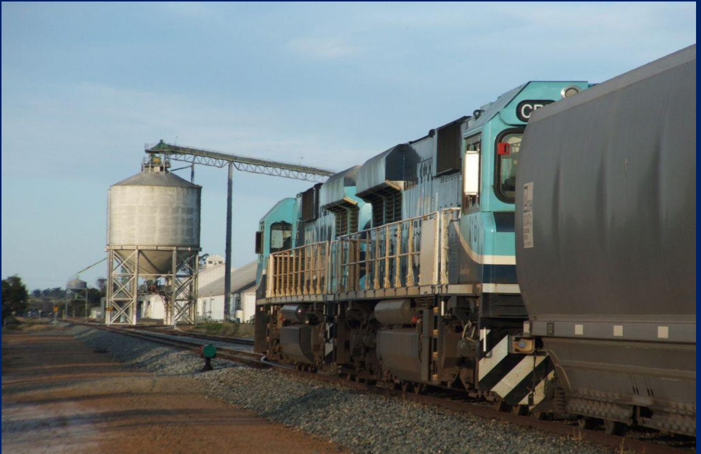
CBH013 & CBH016 about to enter CBH loop at Cranbrook to load October 23rd.