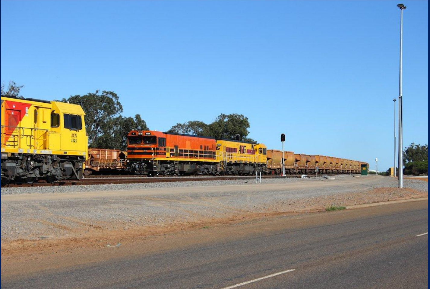
ACN4145 crossing P2506 & P2501 on empty ore in Narngulu yard October 14th.