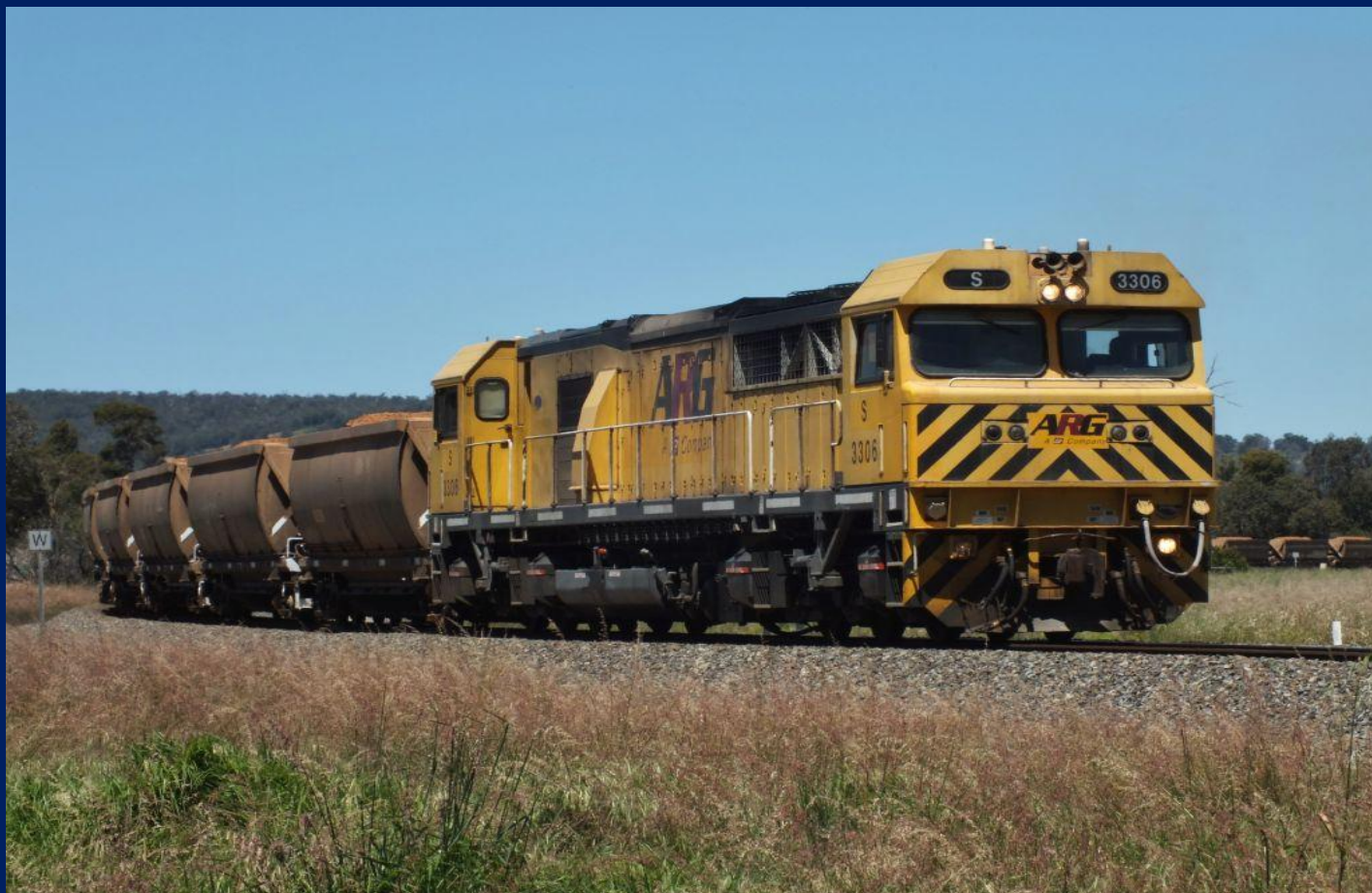
S3306 on 3944 bauxite at Mundijong October 22nd.