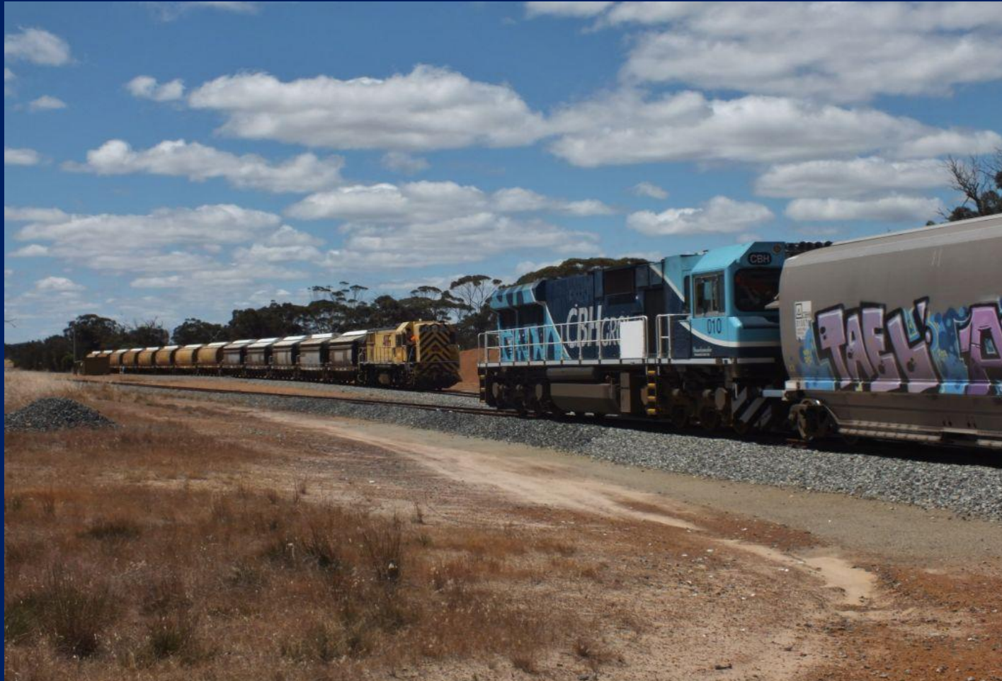
CBH010 on empty grain crosses DAZ1901 in loop Yilliminning October 23rd.