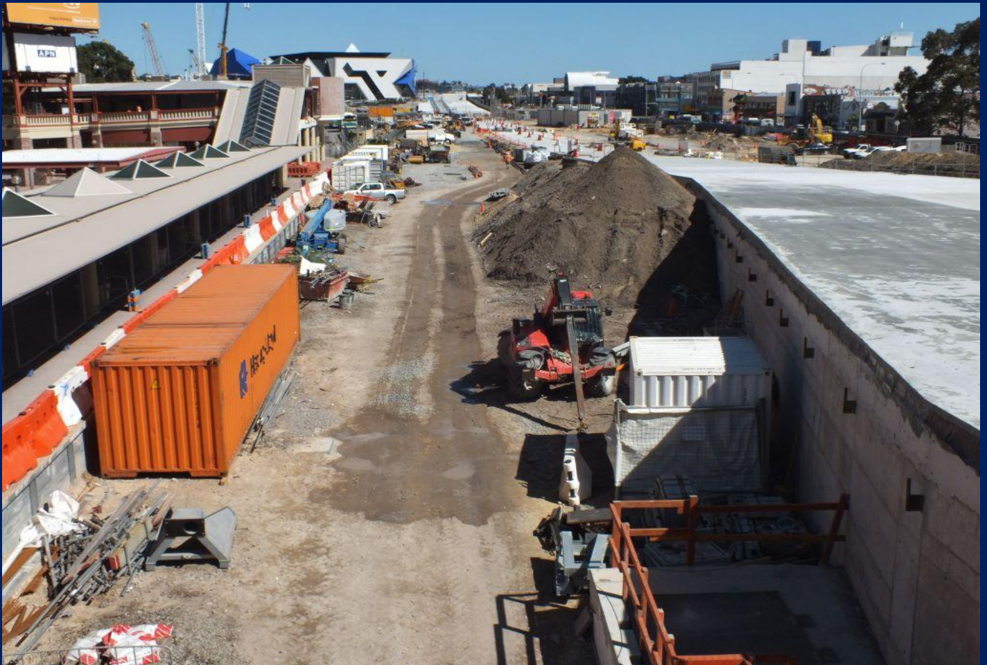
Tunnel completed, Fremantle line and platform 11 removed at Perth Station October 13th.