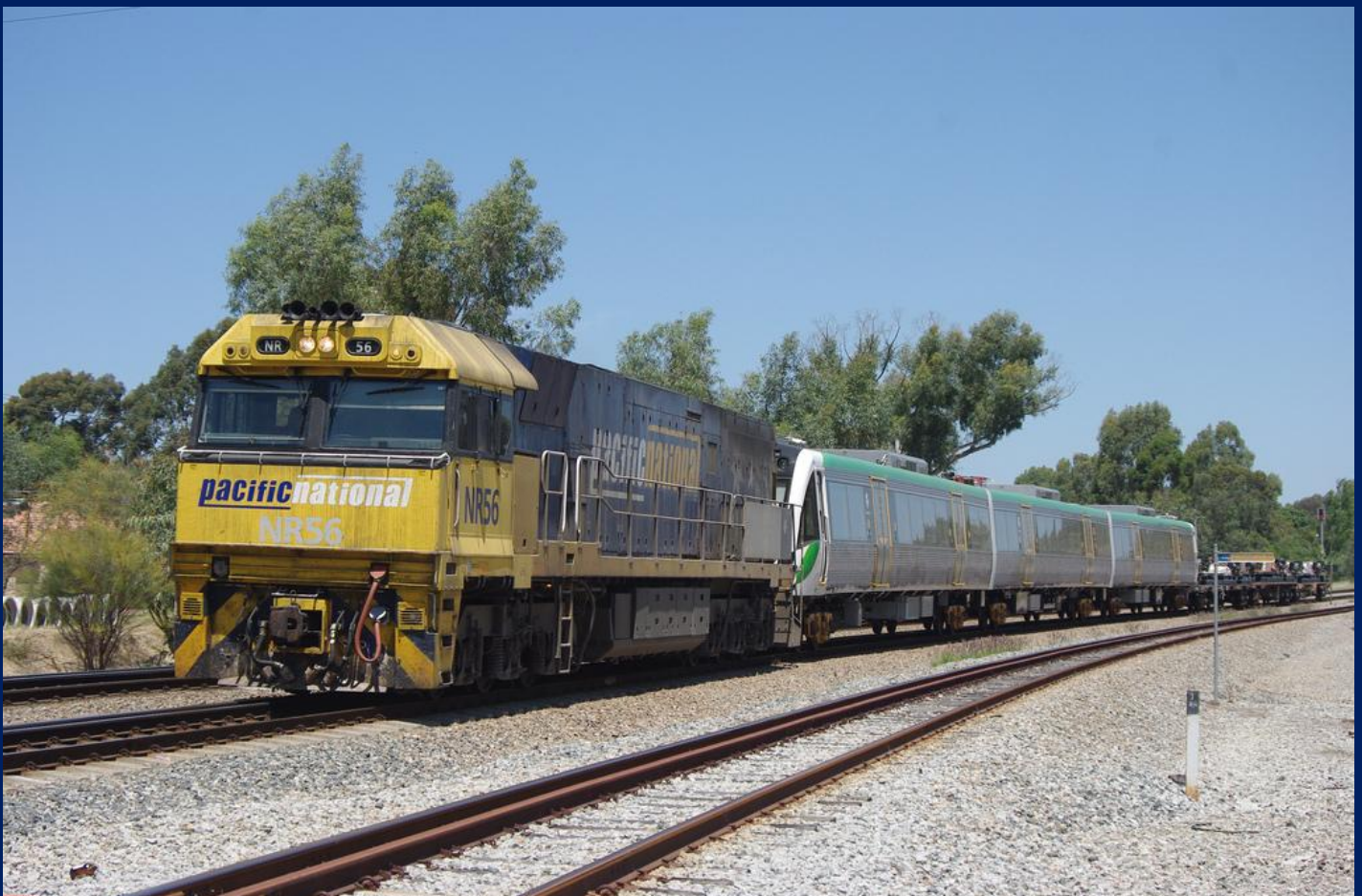
NR56 on 4P31 empty EMU movement set 096 PFT to old workshops Midland 30/10.