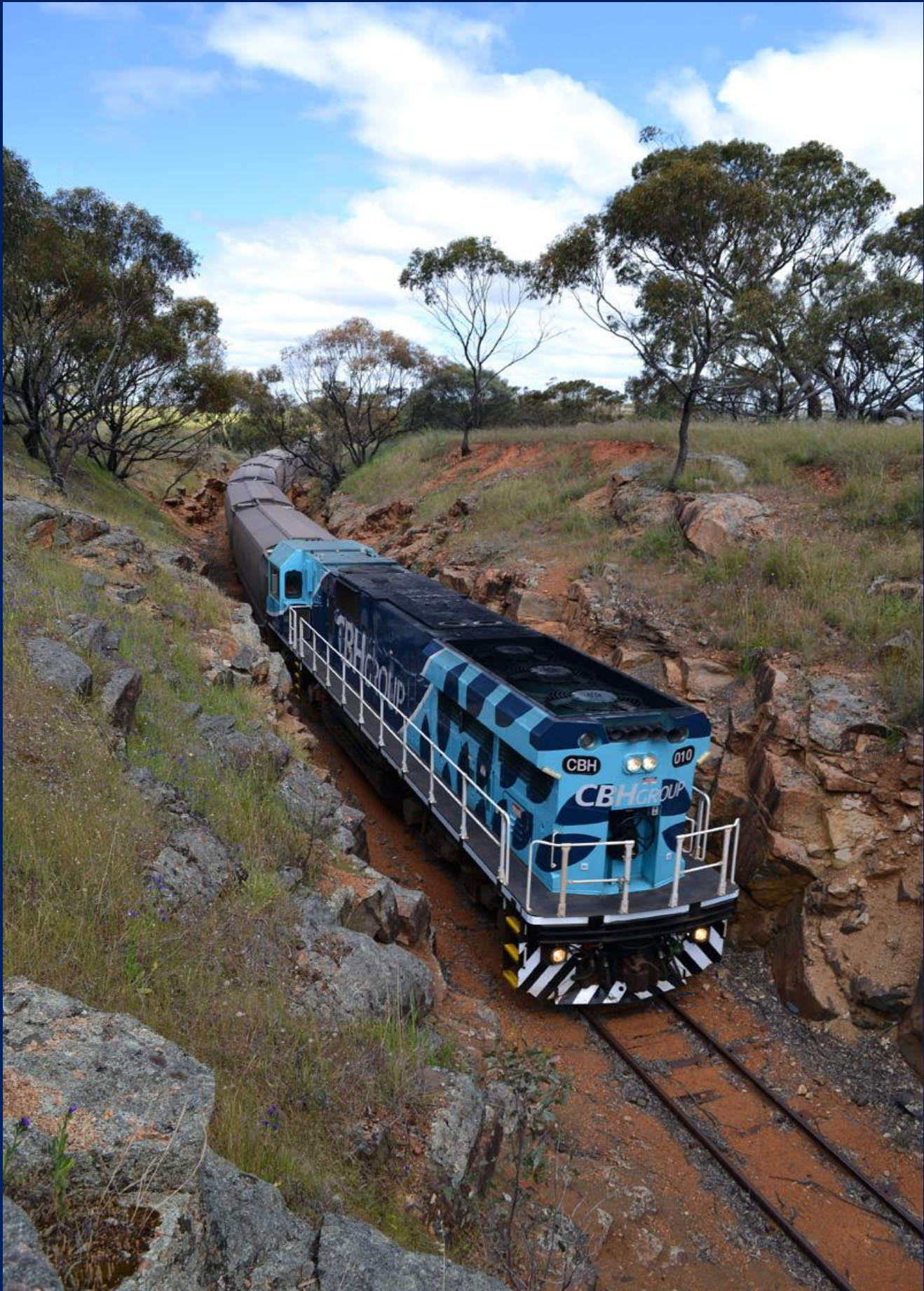
CBH 010 on 6K72 wagon recovery ex Mawson approaching York 11/10. END26/26