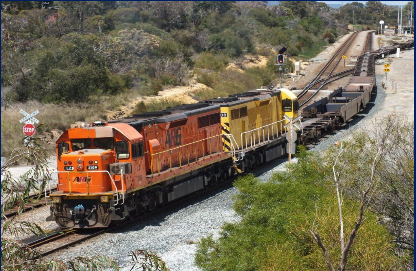
LZ3108 & L3108 on #3 s/g shunter shunting intermodal terminal October 20th.