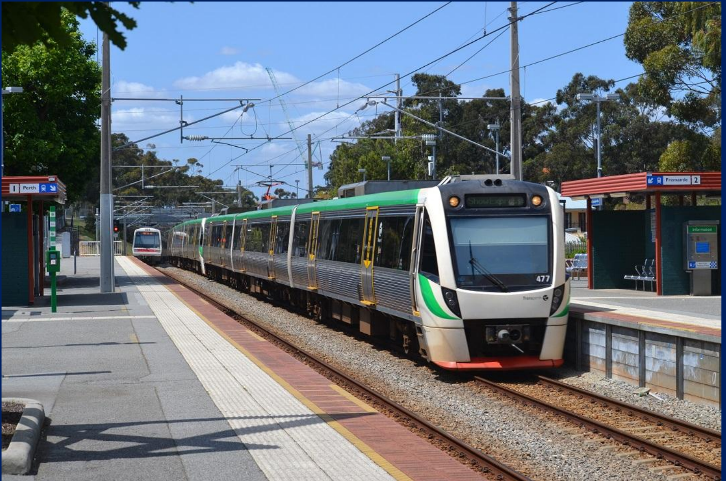
EMU B series set 77 show special crossing A series set 12 at West Leederville 01/10.