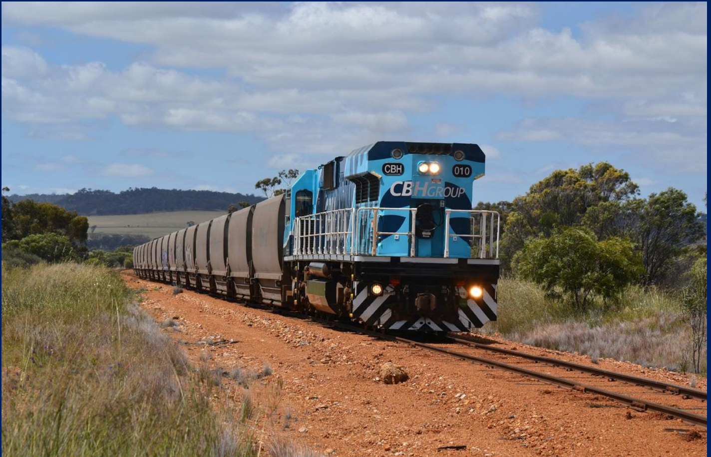
CBH010 on 6K72 last train to run on Tier3 Quairading line that ran light engine to Mawson to recover wagons from Mawson derailment then back to Avon at Mt Hardey October 11th.