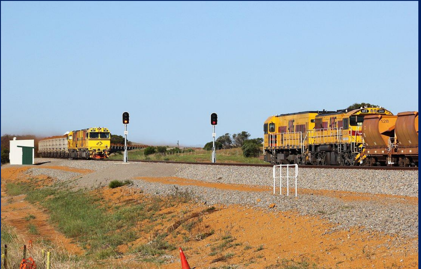
P2502 & DFZ2401 on empty Mt Gibson ore cross ACN4149 & ACN4144 on loaded Karara mining ore at Grants crossing loop on Narngulu Mullewa line October 12th. Photo Phil Melling