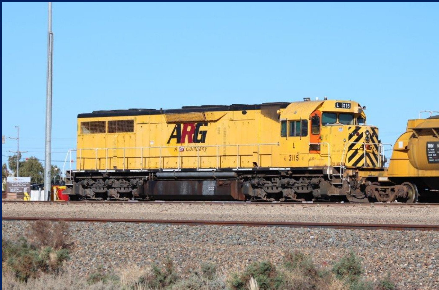
L3115 stabled Kalgoorlie loco with replacement door believed ex 3102 October 5th.