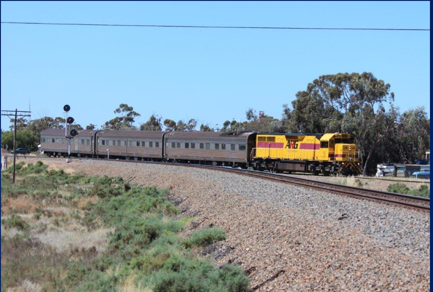
LQ3121 runs AK car inspection train into Kalgoorlie loco to stable on its return from Leonora 12/10.