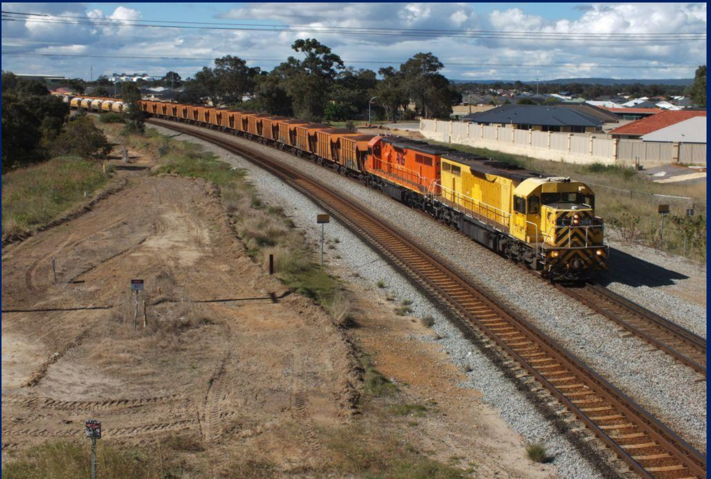
L3108 & LZ3109 on 1034 ore to Kwinana unloader at Welshpool October 20th.