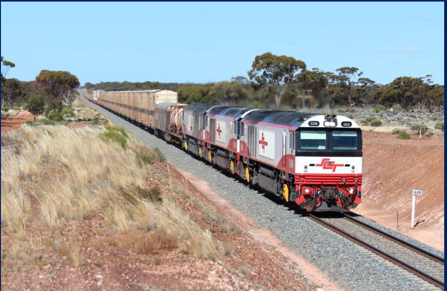
CSR003, CSR004 & CSR009 on 5MP9 at 628km on EGR at Bonnie Vale 12/10.