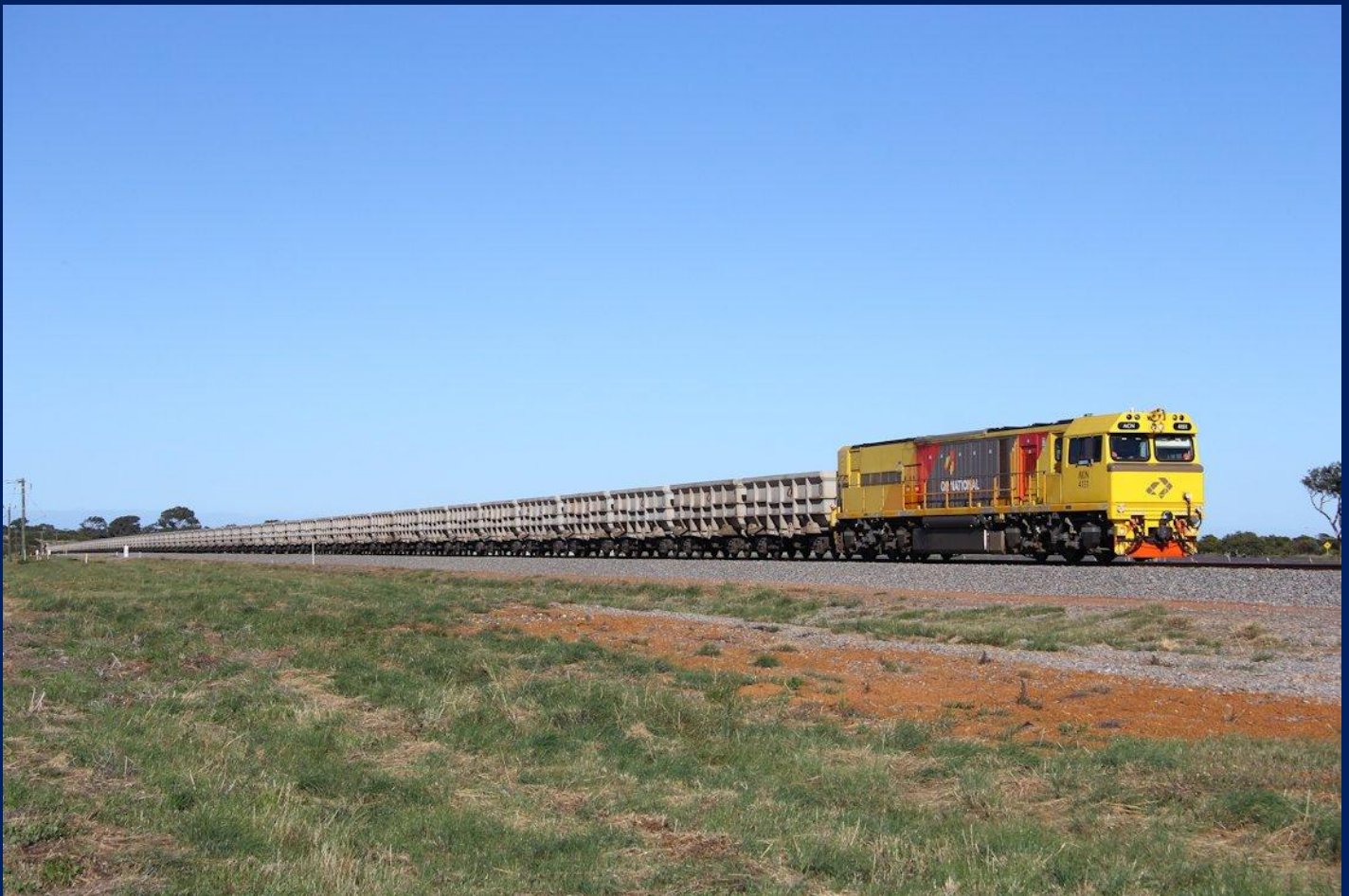
ACN4151 hauls empty Karara ore train away from Narngulu to Narngulu East 01/10.