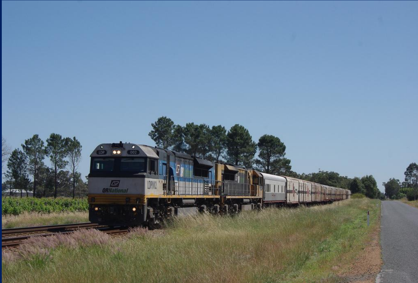
LDP002 & LDP006 on 7AP1 Aurizon extra intermodal and SCT loading Millendon 28/10.