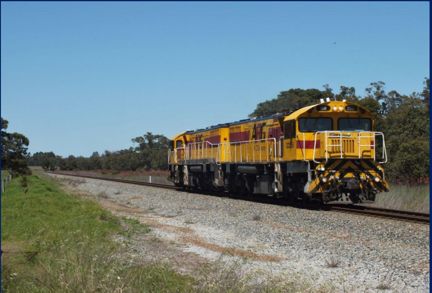
DD2355 & DD2357 on 3542 light engine withdrawn locomotives Picton to Kwinana 22/10.