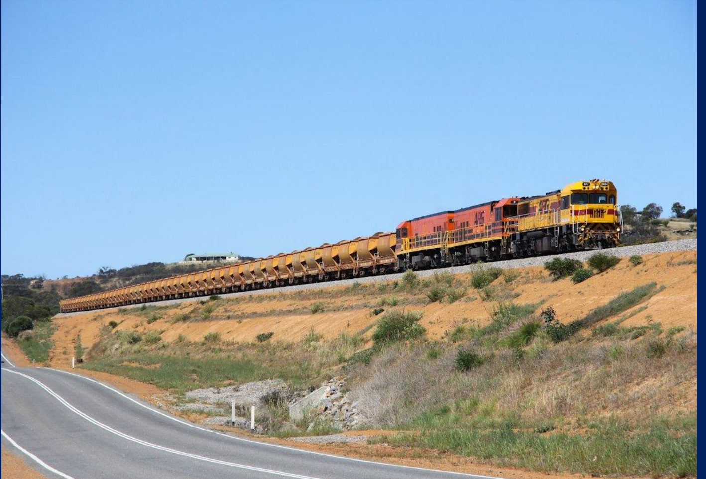
DFZ2404, P2503 & P2507 on Mt Gibson ore at Bringo on October 12th.