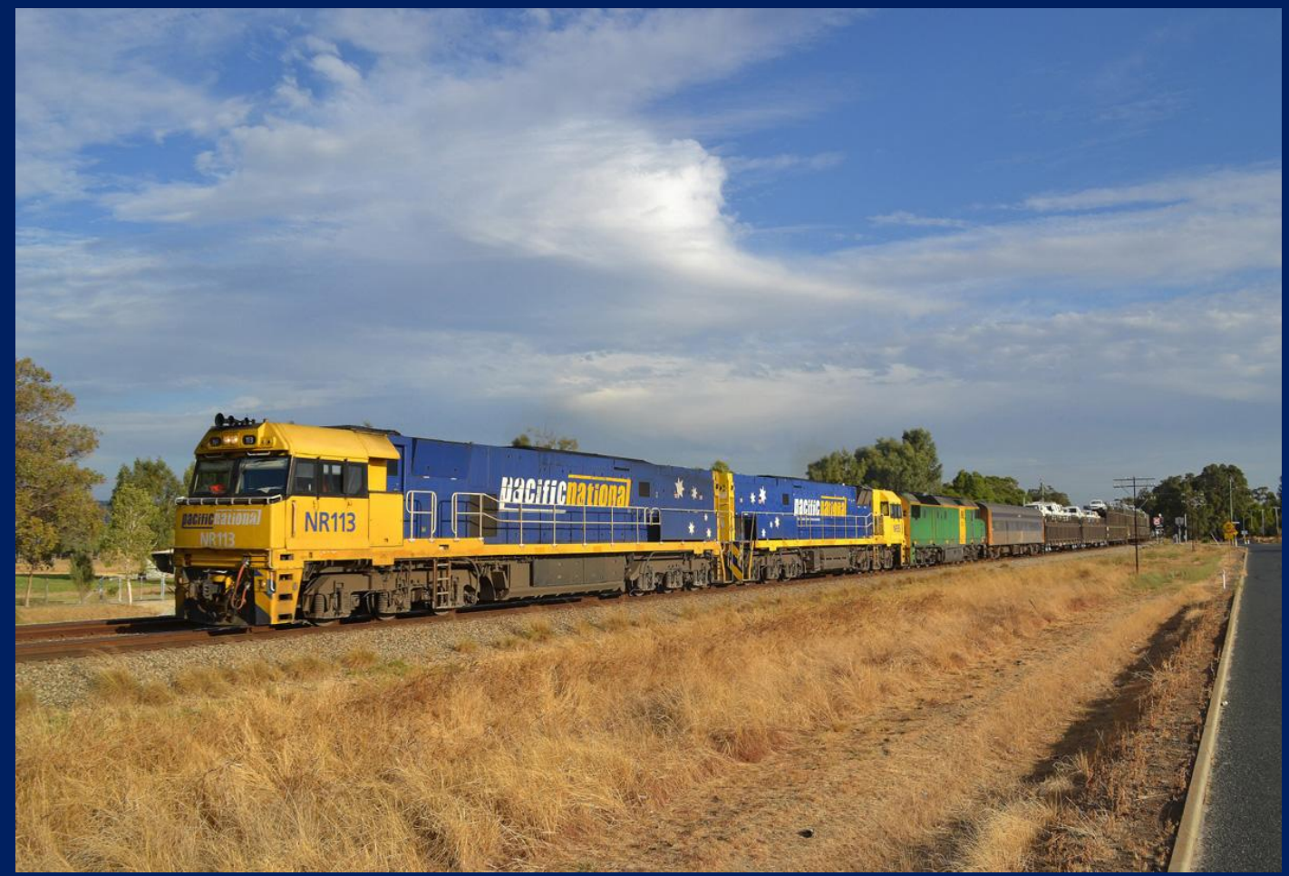
NR113, NR35 & DL48 on 1PM5 intermodal at Herne Hill on April 20th.