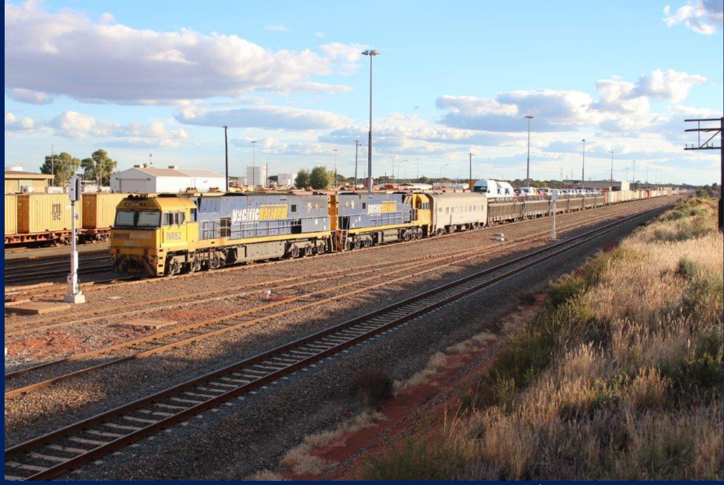
NR82 & NR118 on 4PM6 stabled in West Kalgoorlie owing to TAR derailment 10/4.