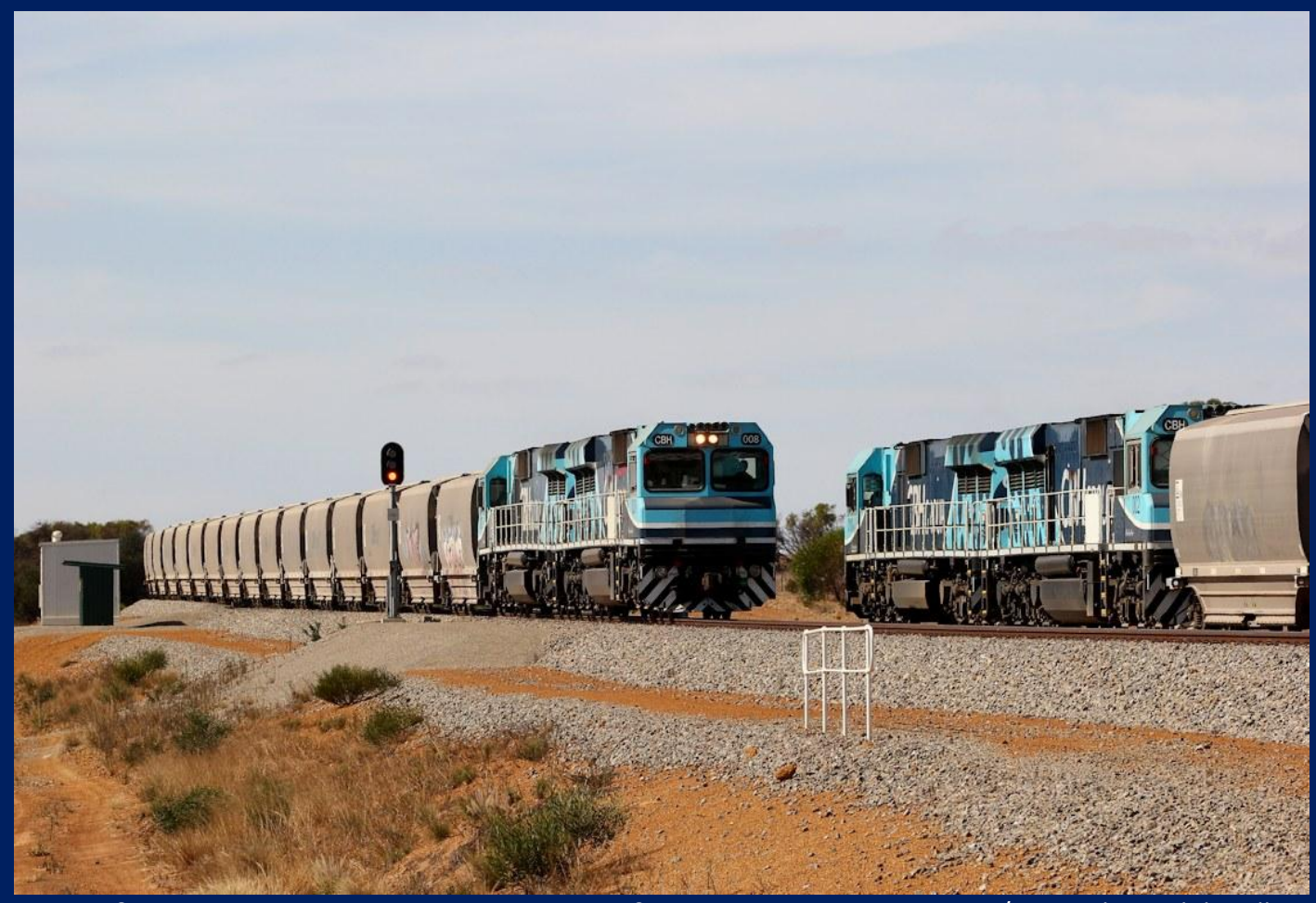
CBH008 & CBH007 on Watco grain crosses CBH010 & CBH002 on empty Grants 21/4.