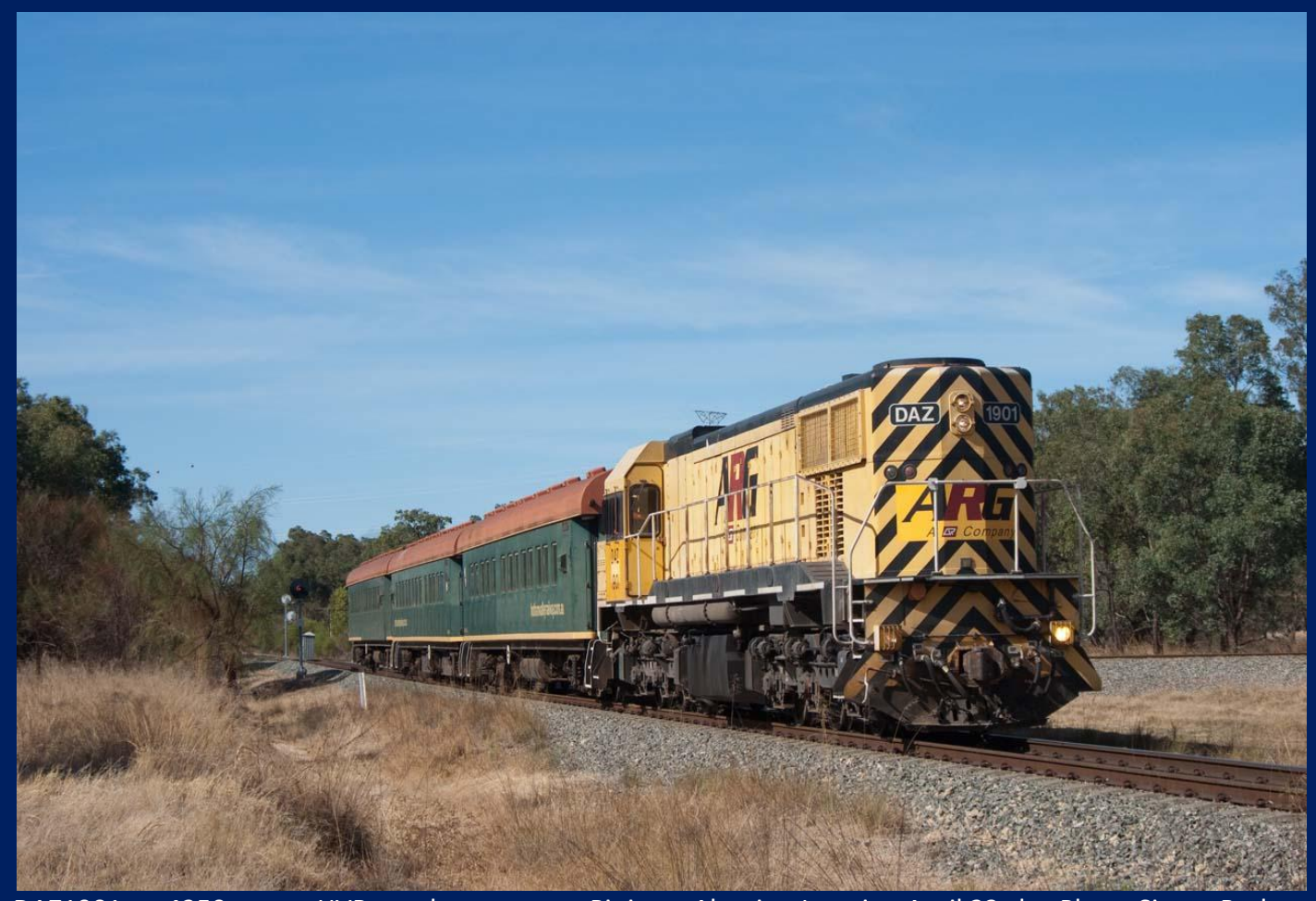
DAZ1901 on 4250 empty HVR coach movement Pinjarra-Alumina Junction April 23rd.