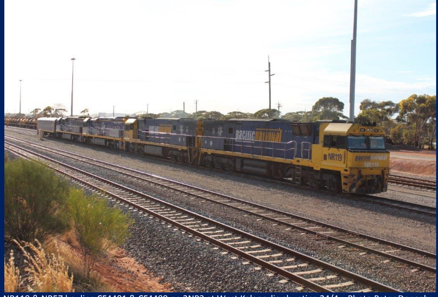
NR119 & NR57 hauling CF4401 & CF4409 on 2NP3 at West Kalgoorlie shunting 24/4.