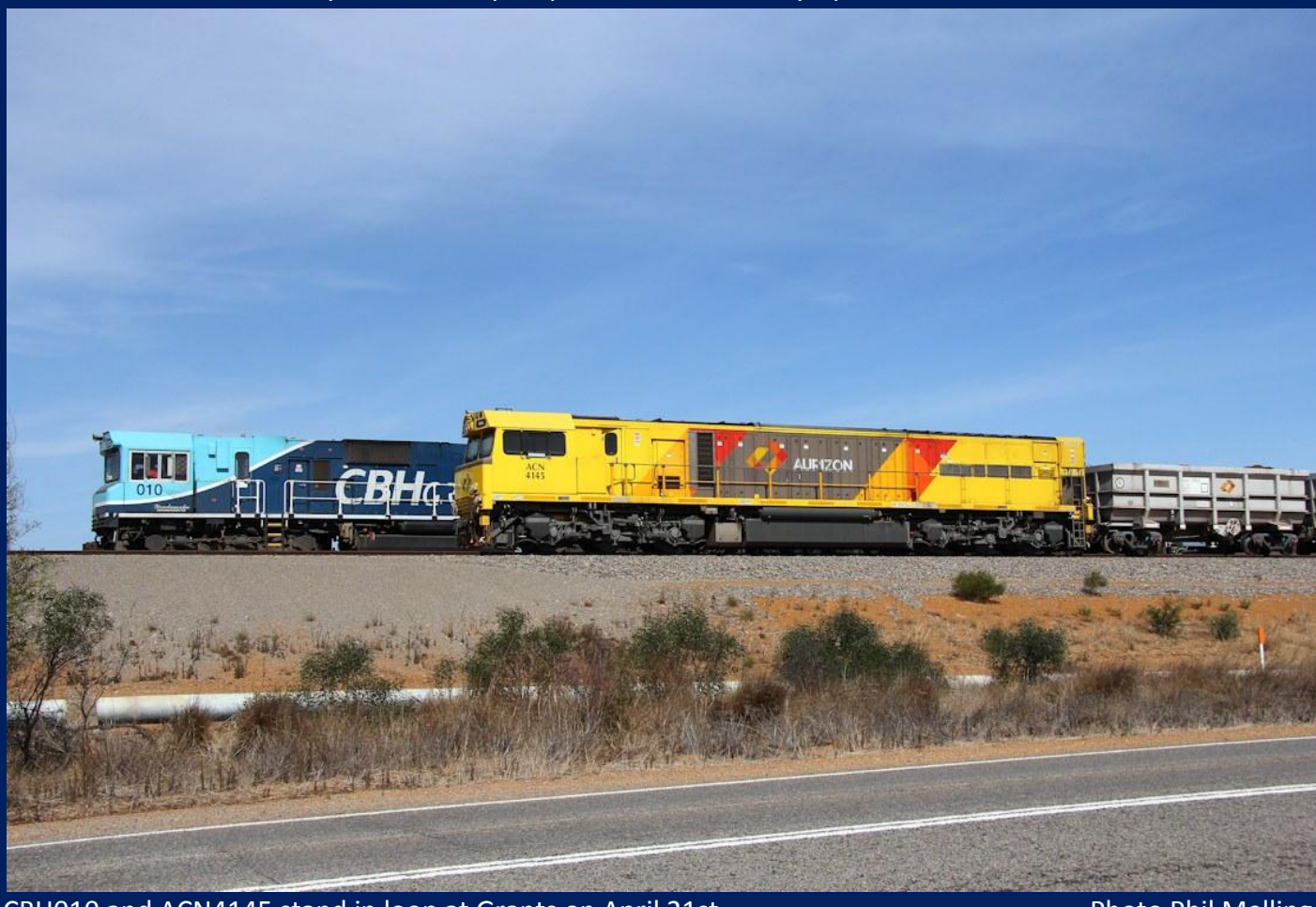
CBH010 and ACN4145 stand in loop at Grants on April 21st.