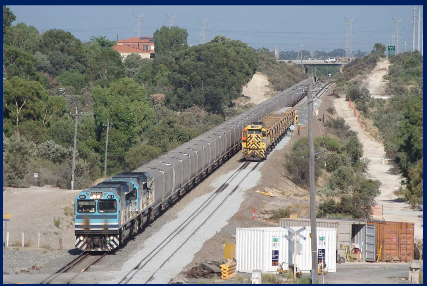
CBH011 & CBH010 on 5K17 empty Watco/CBH grain passing L3115 on 5134 ballast at Jandakot April 10th.