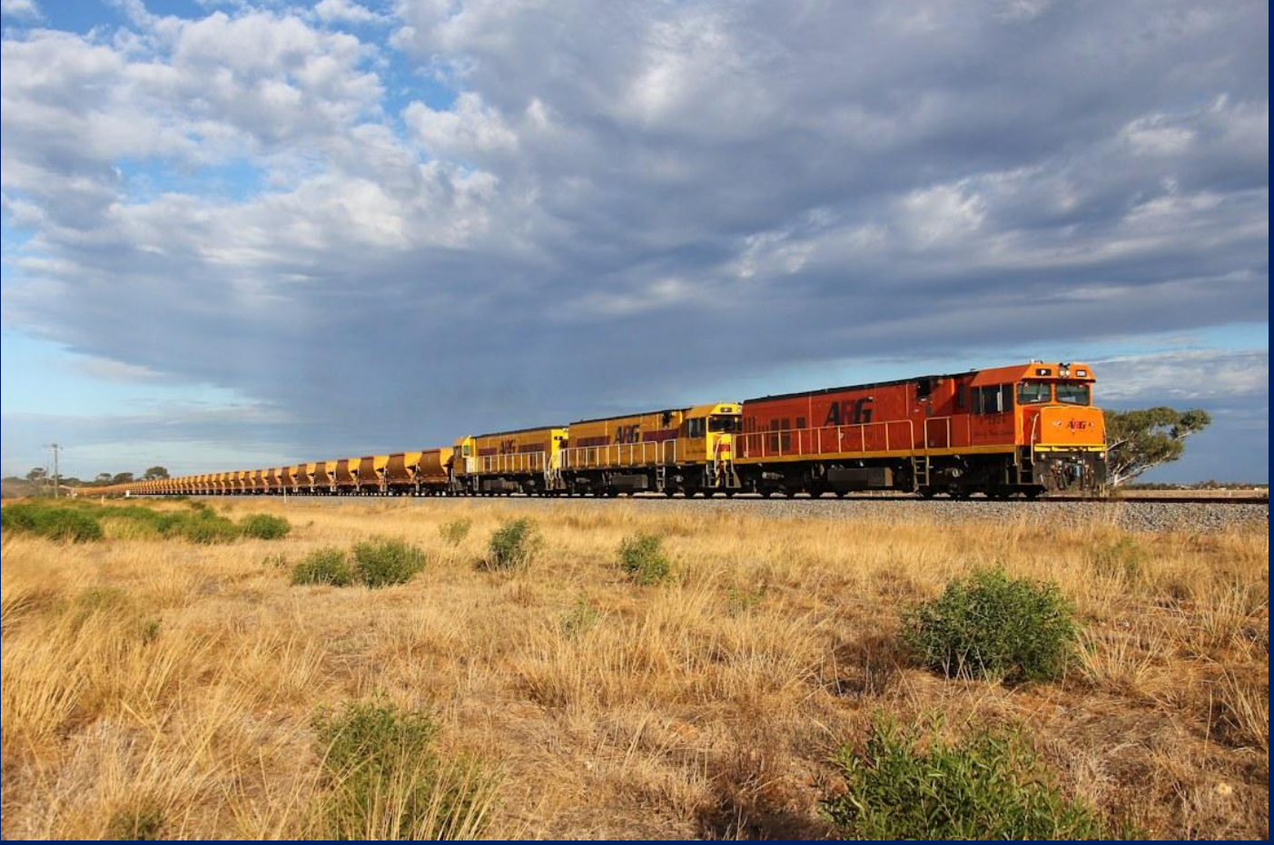
P2509, P2514 & P2510 on 5720 Mt Gibson Perenjori ore at Narngulu East 10/4.