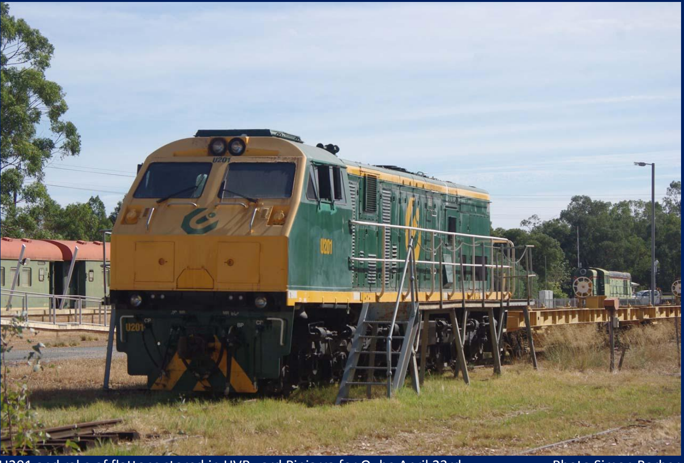
U201 and rake of flattops stored in HVR yard Pinjarra for Qube April 23rd.