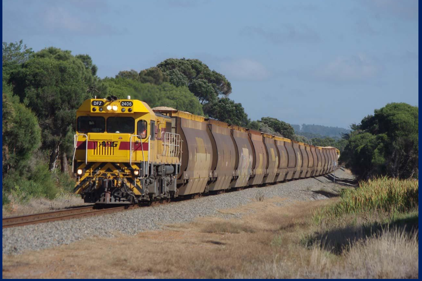
DFZ2406 & DFZ2403 [on rear] on 2603 woodchips at Elleker April 14th.