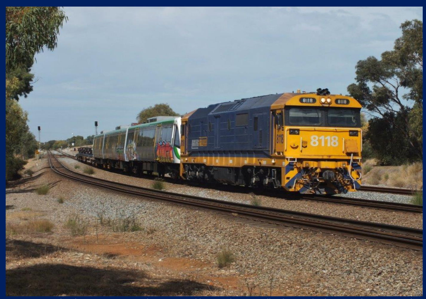
8118 on 6P31 hauls EMU set #99 and its powered bogies thru Woodbridge April 4th.