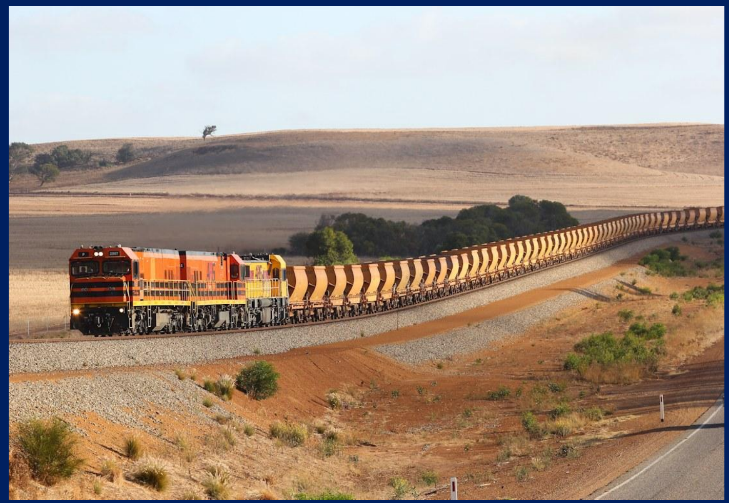
P2507, P2506 & DBZ2407 on 7720 empty ore east of Moonyoonooka on April 19th.