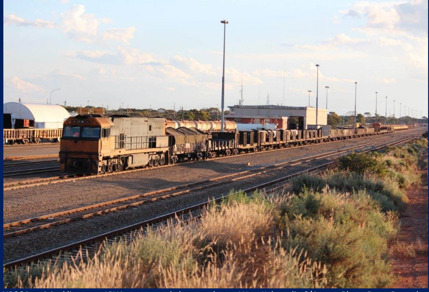
NR86 in original livery on 1PX4 empty steel about to depart West Kalgoorlie 6/4.