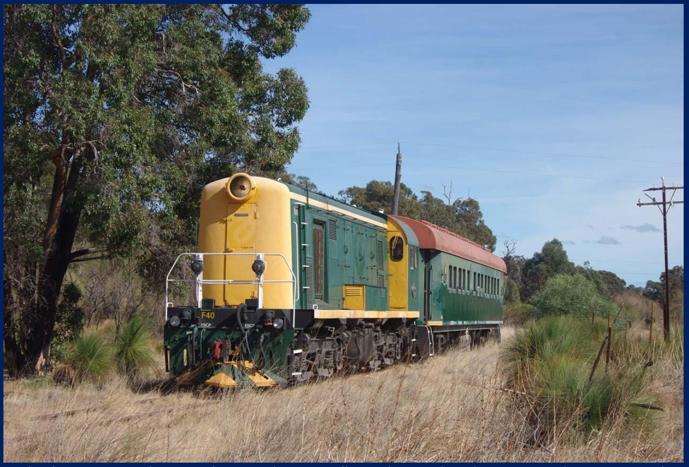
F40 hauling a HVR coach approaching Isandra on Dwellingup line April 23rd.