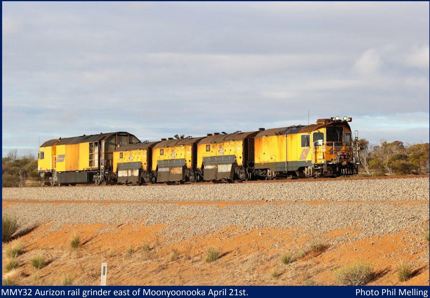
MMY32 Aurizon rail grinder east of Moonyoonooka April 21st.