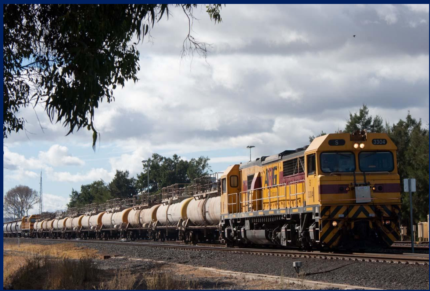
S3302 [box on front has Cattron DPU equipment] S3307 DPU on 2832 empty caustic/alumina at Picton 21/4