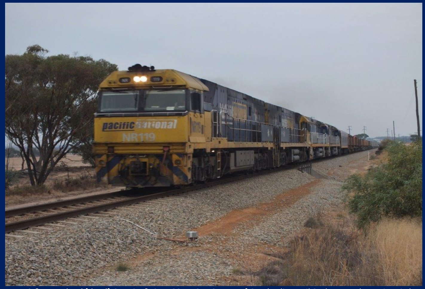
NR119 & NR57 haul [dead] CF4401 & CF4409 on 2NP3 west of Cunderdin April 24th.