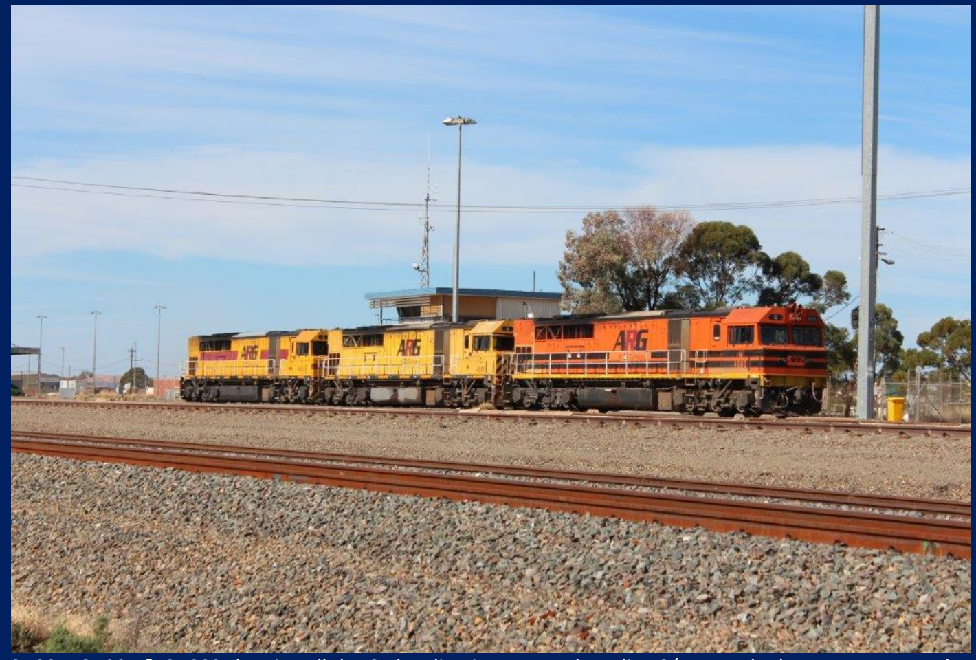
Q4005, Q4007 & Q4002 showing all the Q class liveries West Kalgoorlie 18/4.