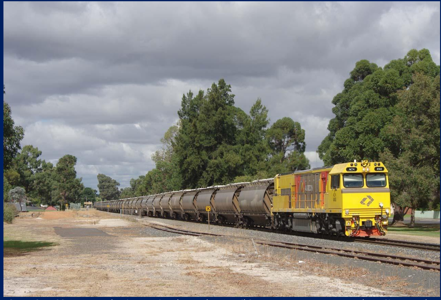
ACN4143 on 2874 empty alumina passing thru Yarloop April 21st.