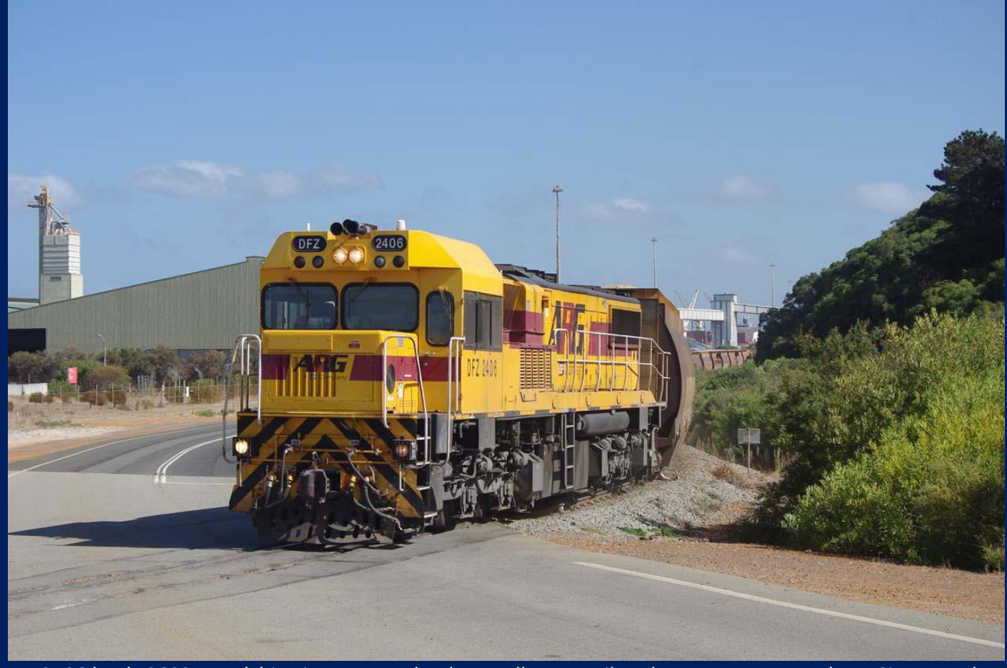
DFZ2406 leads 2603 woodchips into port unloader at Albany April 14th.