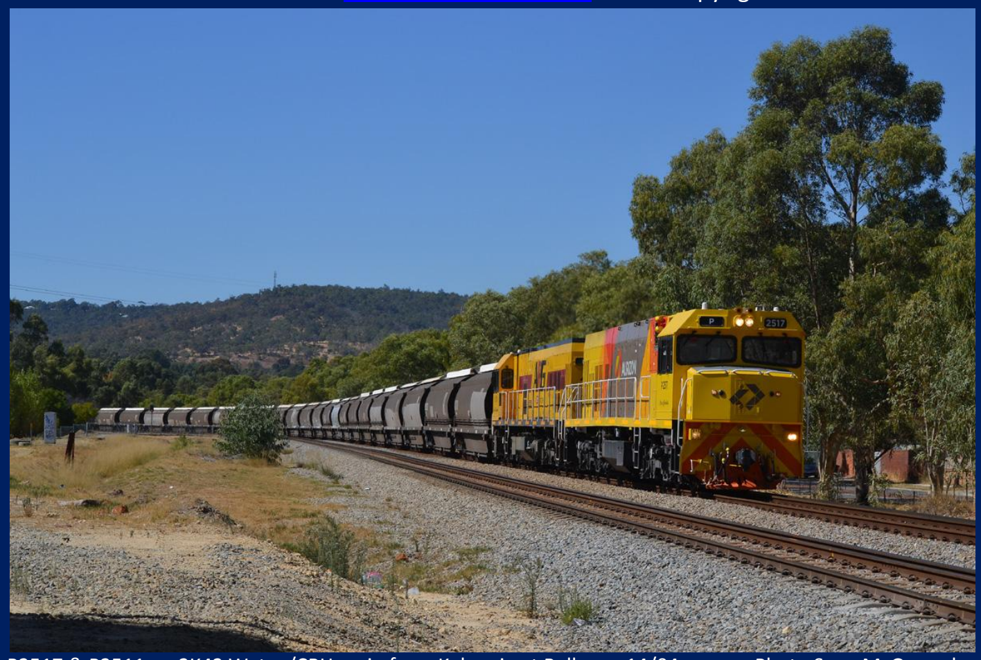
P2517 & P2511 on 2K42 Watco/CBH grain from Kalannie at Bellevue 14/04.