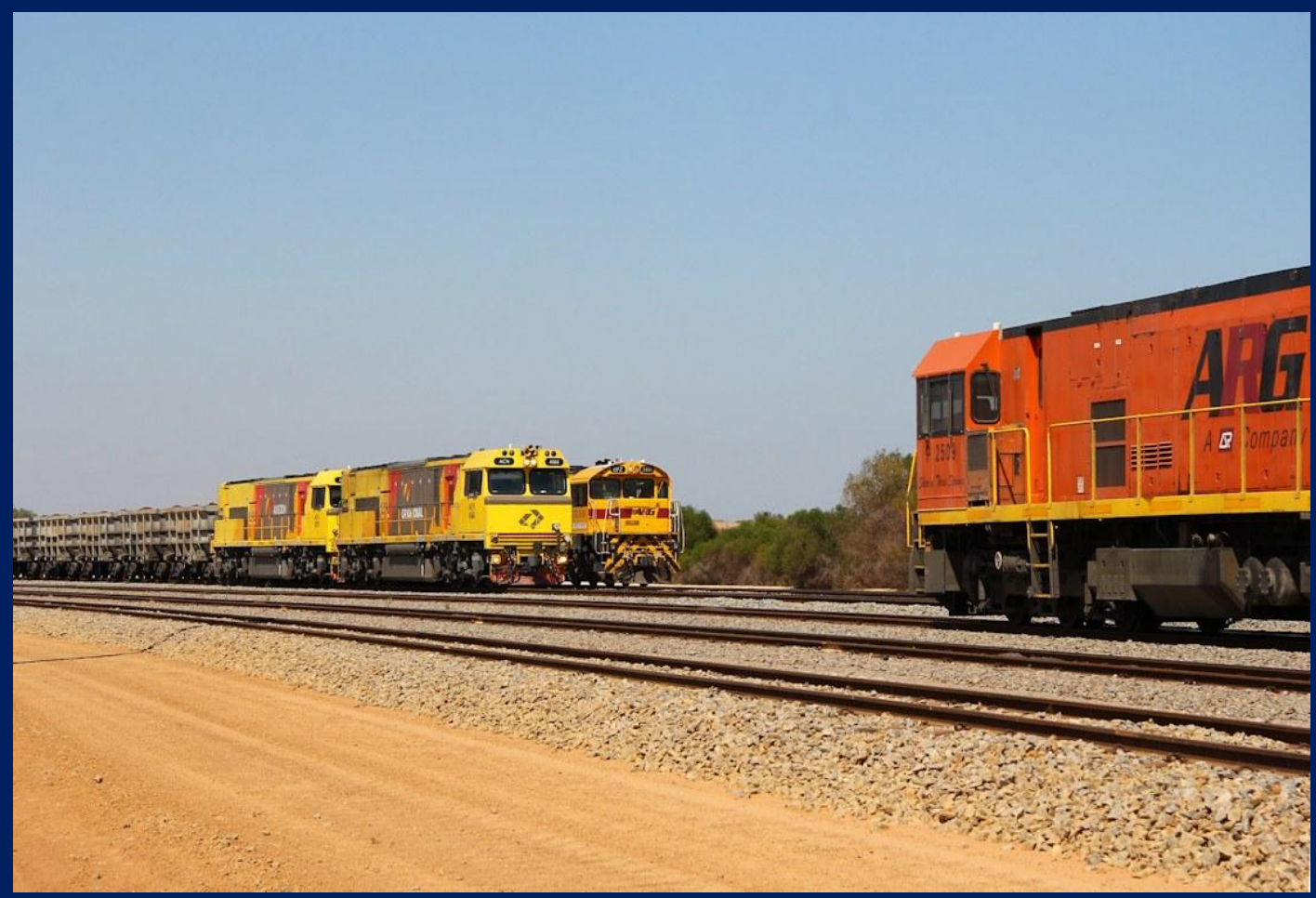
P2509 crossing DFZ2401 and ACN4168 & ACN4170 all on ores in Narngulu yard April 7th.