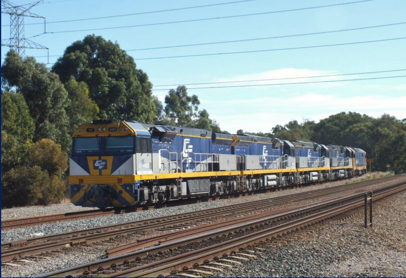
CF4403, CF4410, CF4409 & CF4401 being hauled by 8118 to PTA line at Woodbridge 29/4.