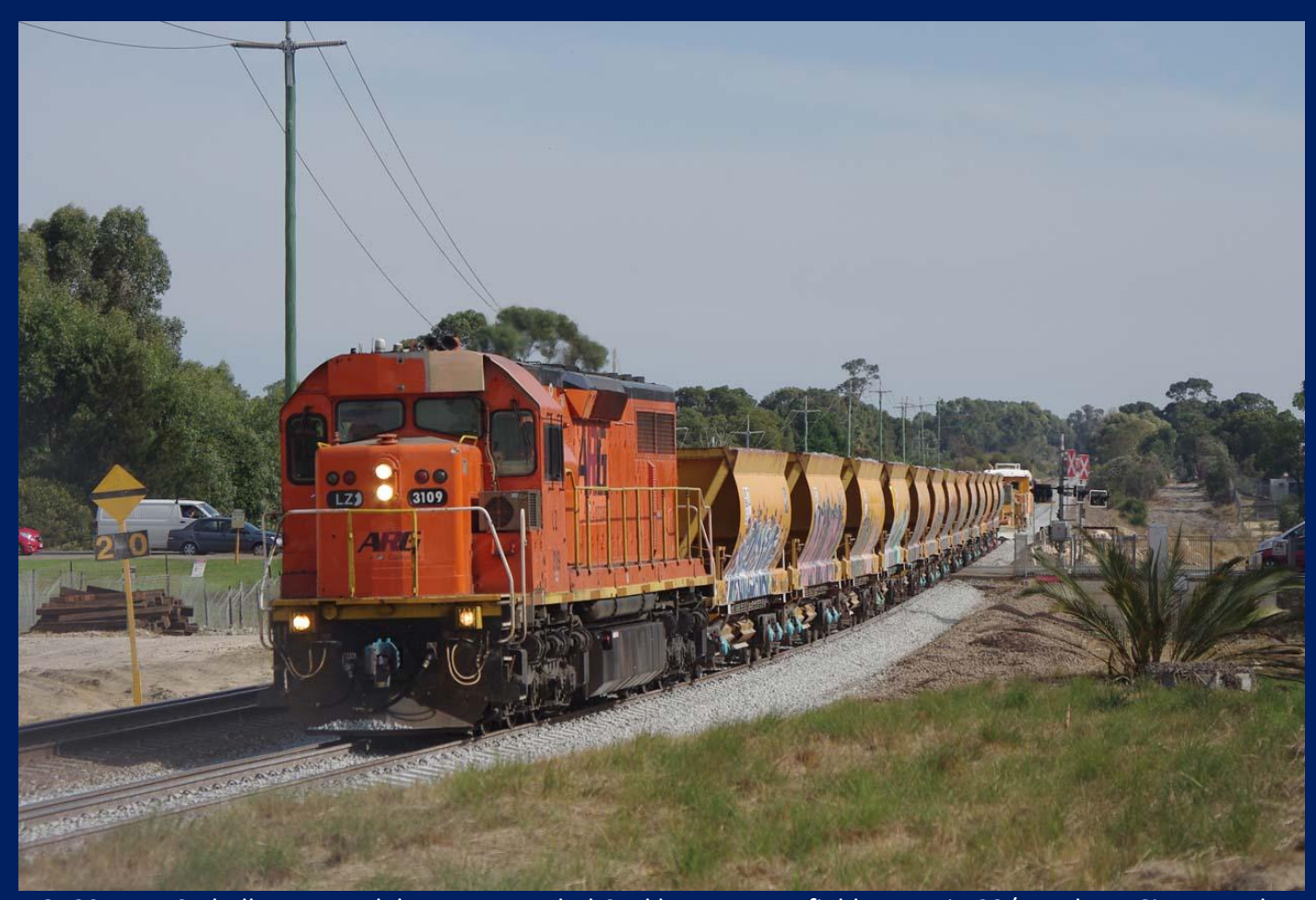
LZ3109 on 4134 ballast at Jandakot on upgraded Cockburn Forrestfield Up Main 23/4.