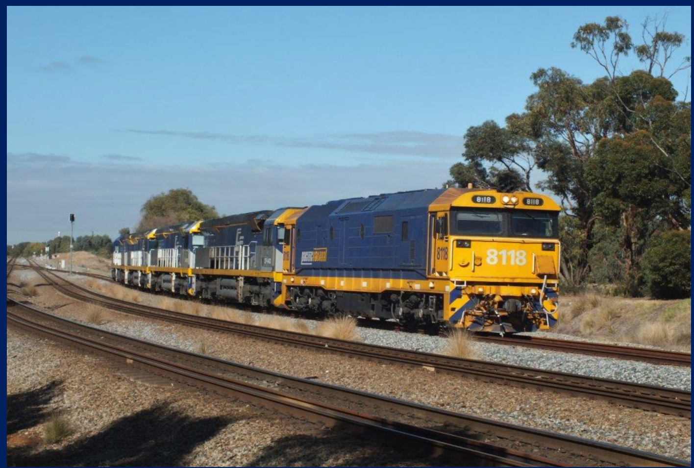
8118 hauls CF4401, CF4409, CF4410 & CF4403 on 3PN1 transfer at Woodbridge 29/4.