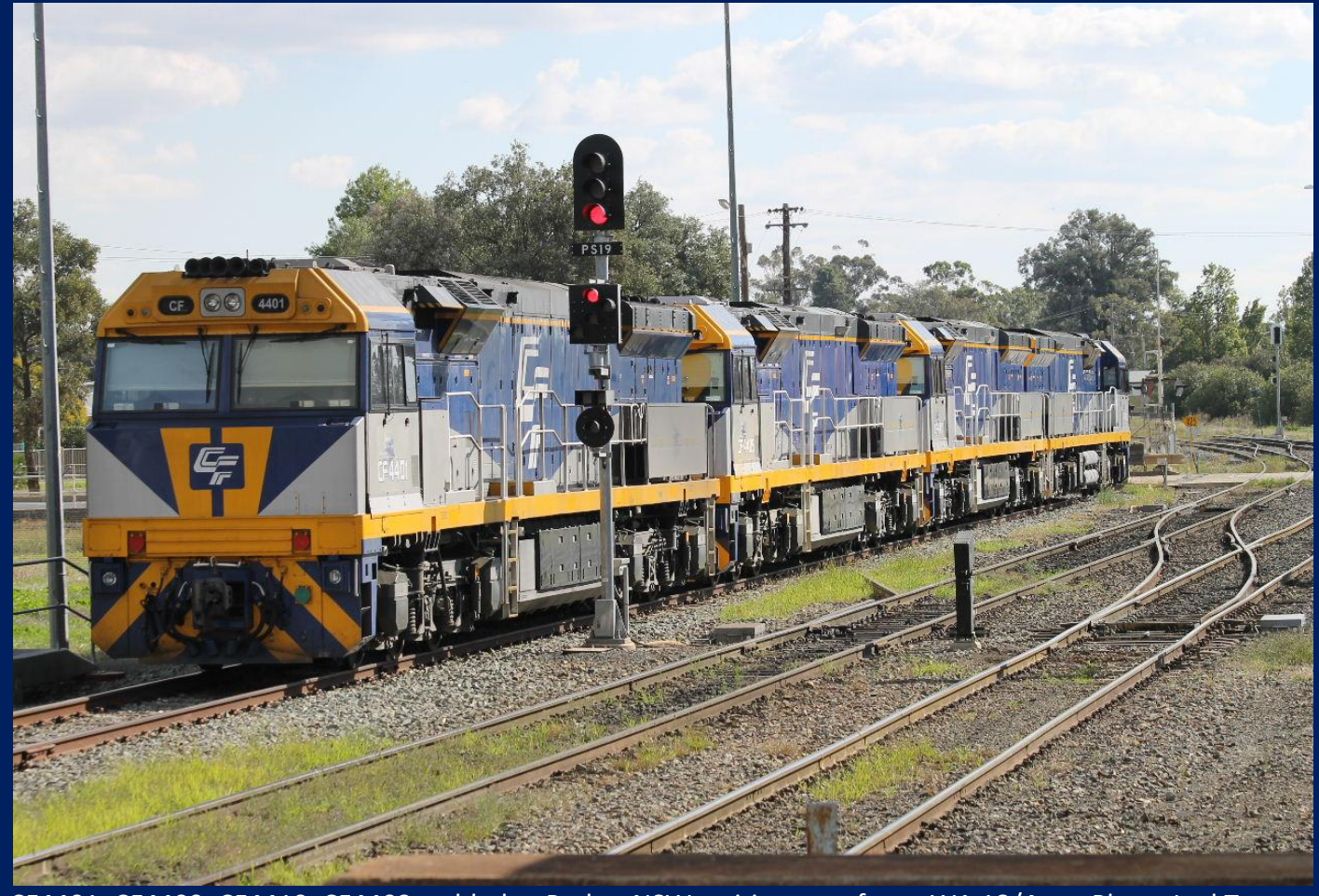
CF4401, CF4409, CF4410, CF4403 stabled at Parkes NSW waiting transfer to WA 18/4.