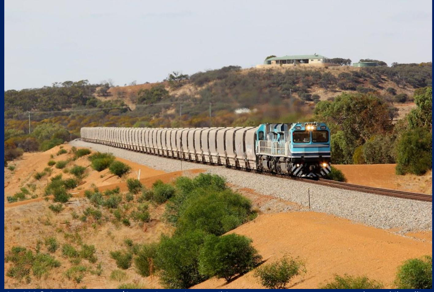
CBH008 & CBH007 on Watco/CBH grain at Bringo April 21st.