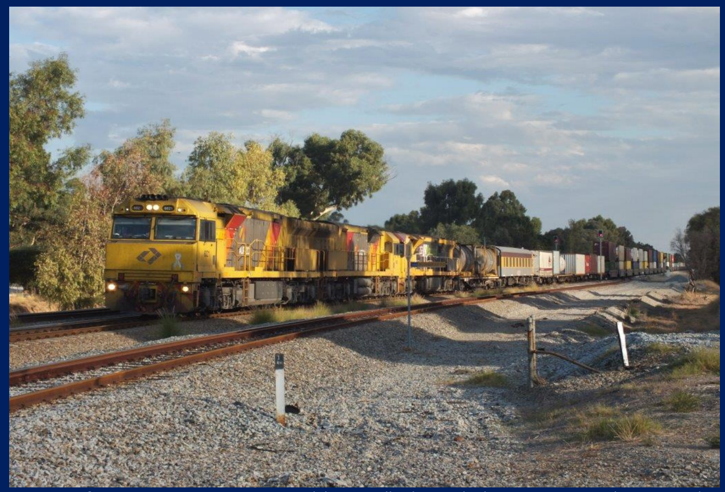
6021, 6016 & 6006 on 7PM1 Aurizon intermodal at Woodbridge April 5th.