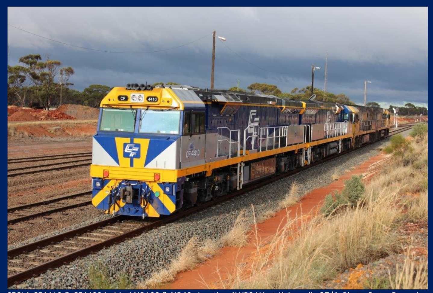
CFCLA CF4410 & CF4403 behind NR108 & NR42 shunting 4WP2 West Kalgoorlie 27/4.