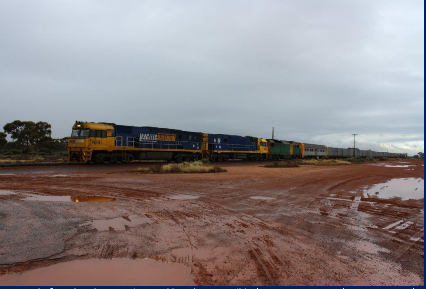
NR47, NR81 & DL48 on 6MP4 run into muddy Parkeston April 27th.