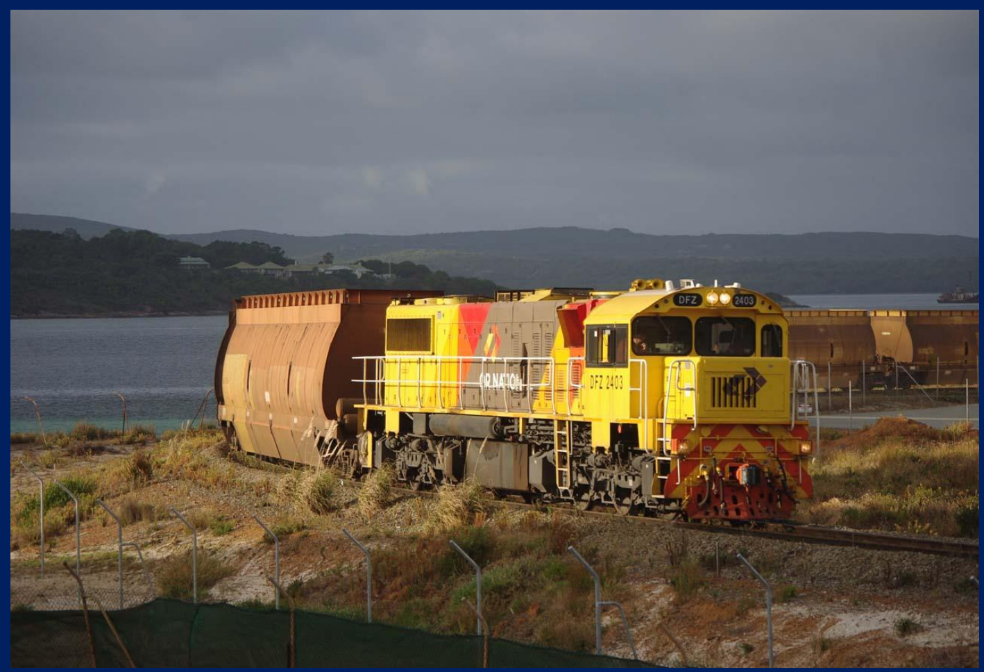
DFZ2403 on 2602 woodchip about to depart port unloader Albany April 14th.