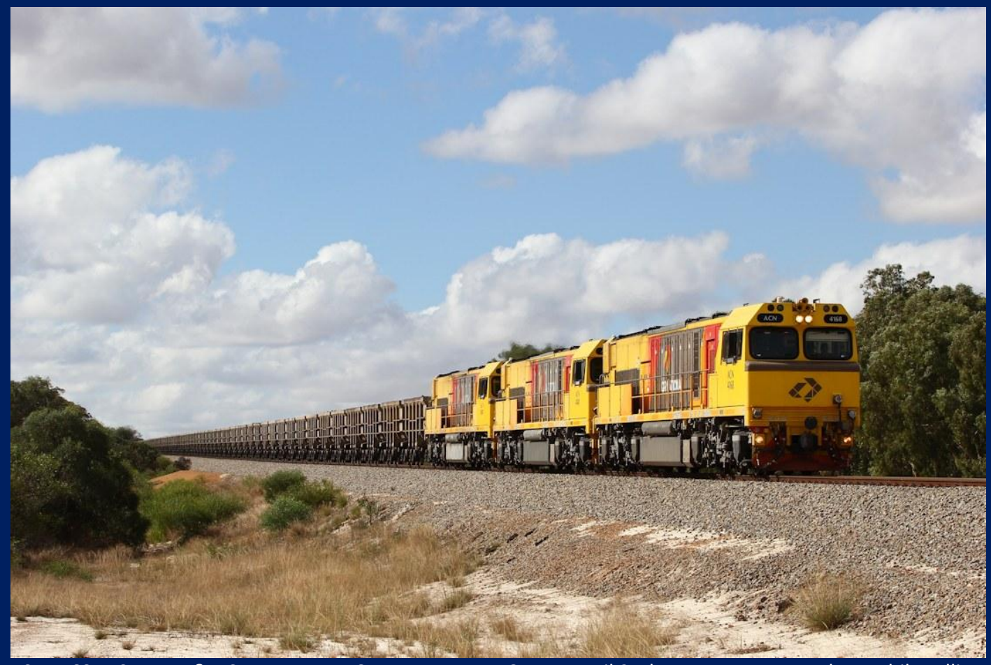
ACN4168, ACN4141 & ACN4147 on 1761 Karara ore at Grants April 27th.