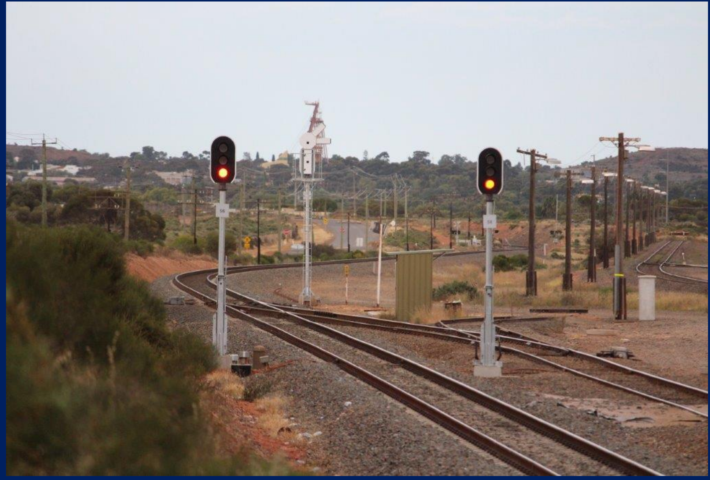
New three aspect signalling installed at east end West Kalgoorlie yard April 5th.