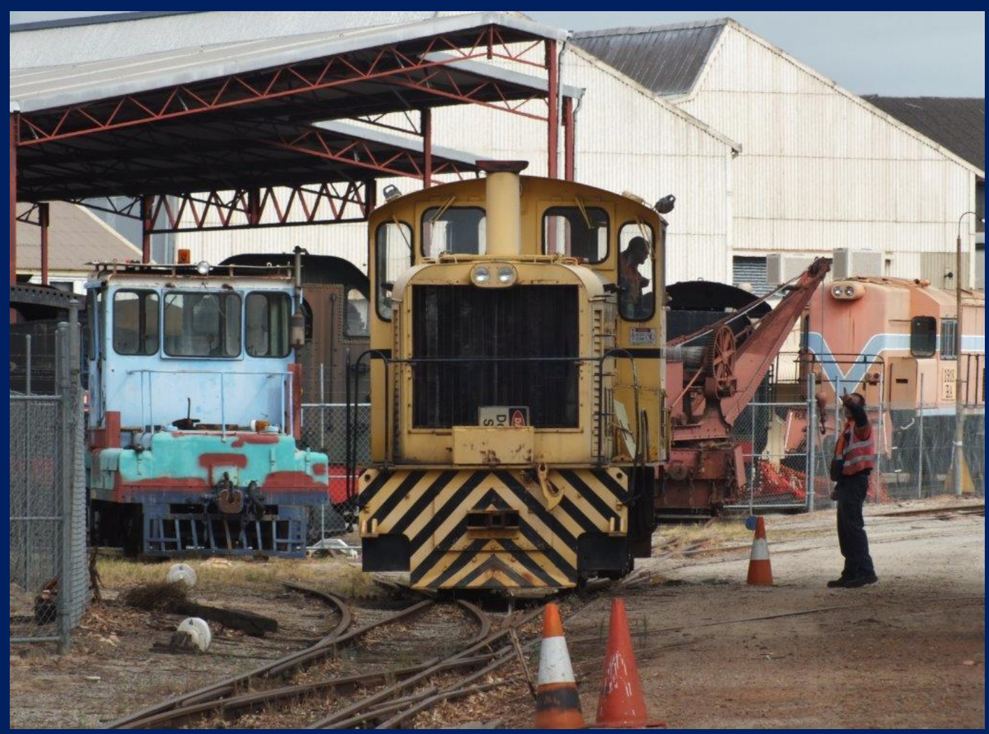
UGL Bassendean shunter ex Westrail TA1813 shunting in UGL siding adjacent to RHWA Museum April 30th on only private siding left on suburban network with access to PTA lines.