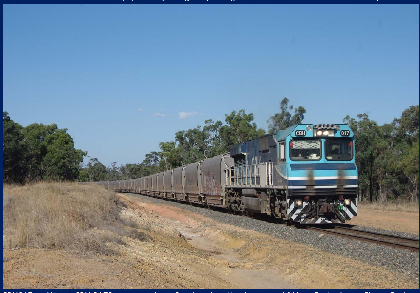
CBH017 on Watco CBH 2A72 empty grain to Cranbrook at Kendenup on 14/4.