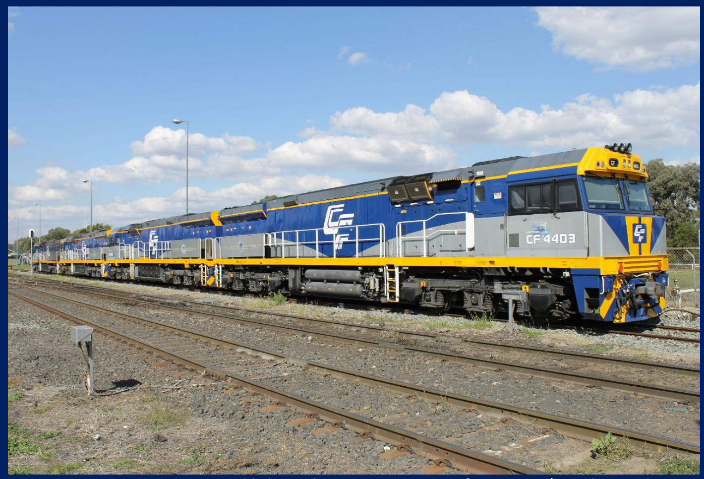
CF4403, CF4409, CF4401 stabled at Parkes NSW awaiting transfer to WA 18/4.