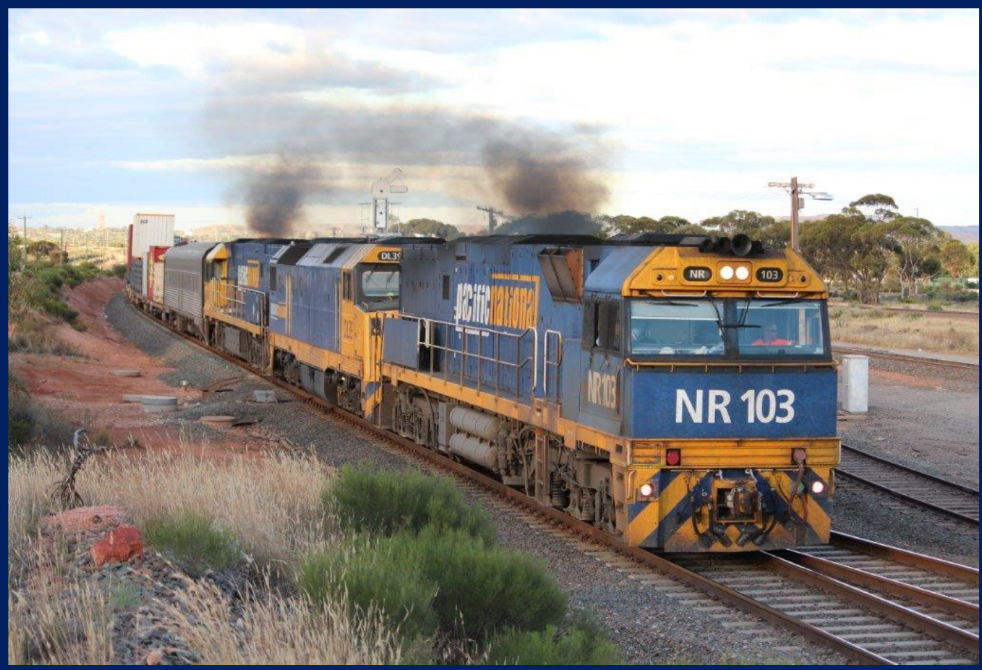
NR103, DL39 [first DL in over a year] & NR44 on 2MP5 entering West Kalgoorlie 9/4.