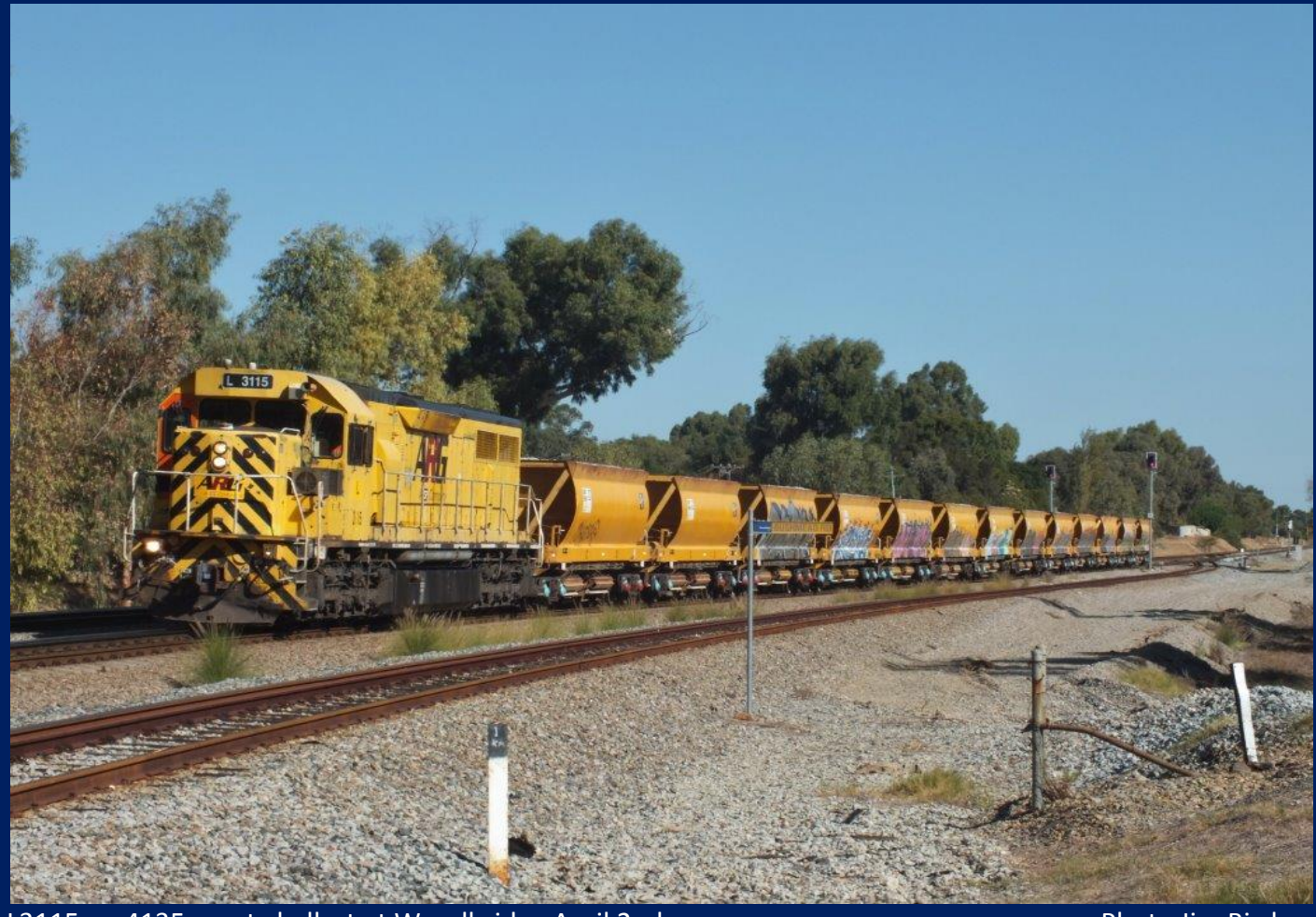
L3115 on 4135 empty ballast at Woodbridge April 2nd.