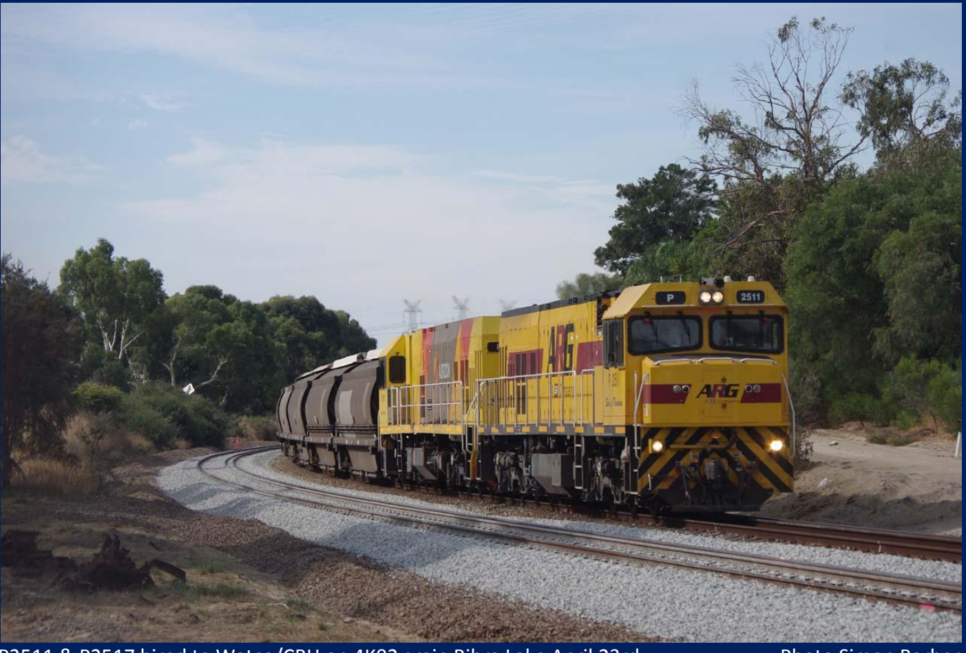
P2511 & P2517 hired to Watco/CBH on 4K02 grain Bibra Lake April 23rd.