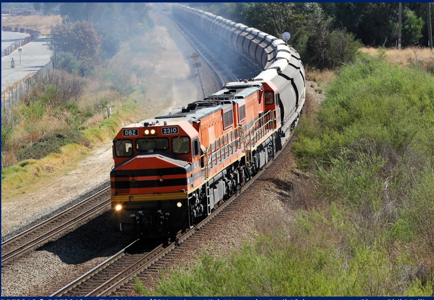
DBZ2310 & DBZ2312 on 7K42 Watco/CBH grain at High Wycombe April 13th.