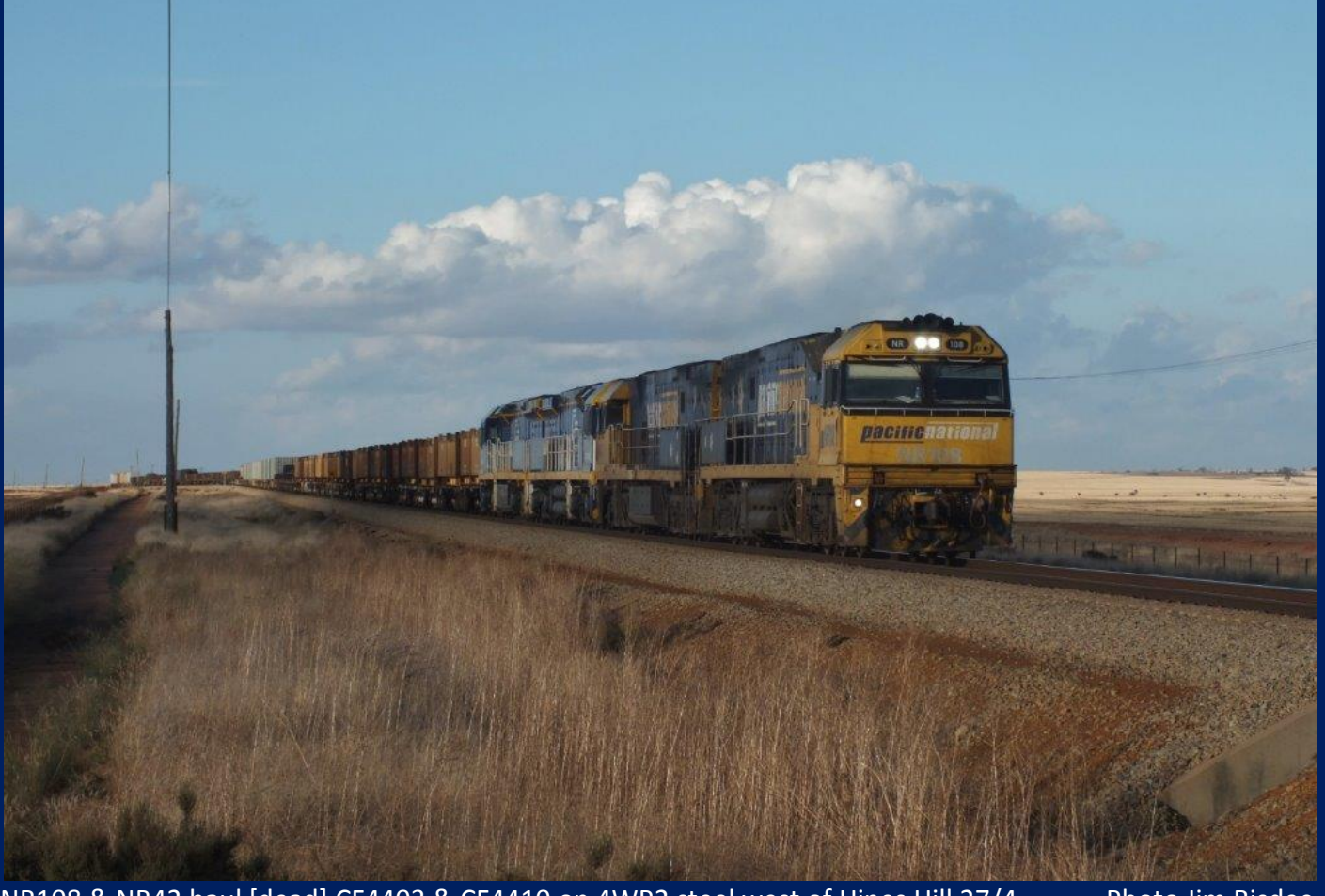
NR108 & NR42 haul [dead] CF4403 & CF4410 on 4WP2 steel west of Hines Hill 27/4.