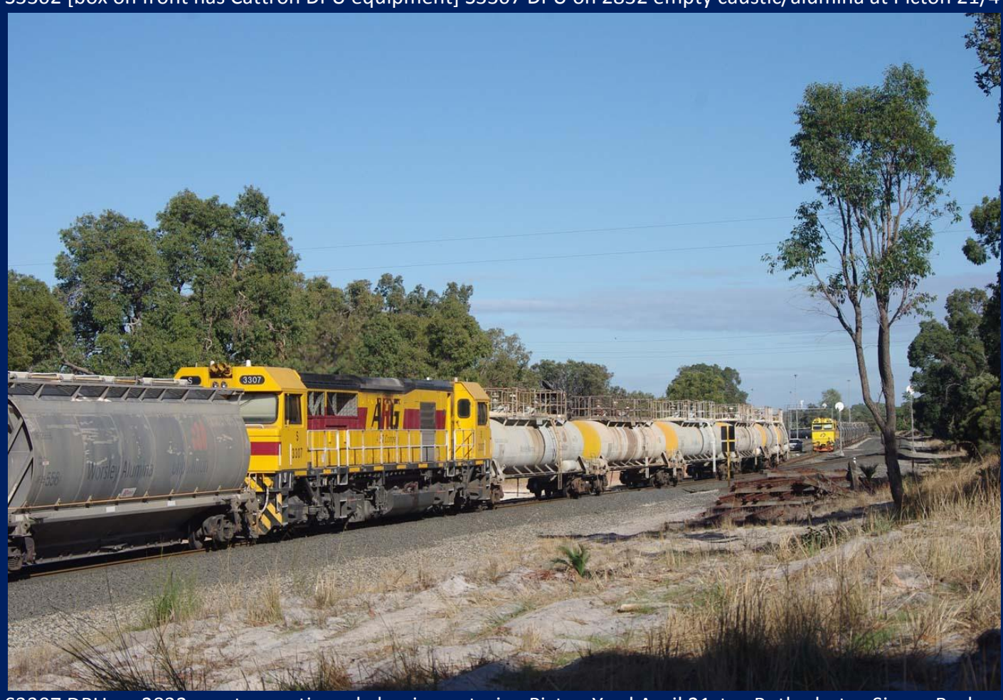
S3307 DPU on 2832 empty caustic and alumina entering Picton Yard April 21st.