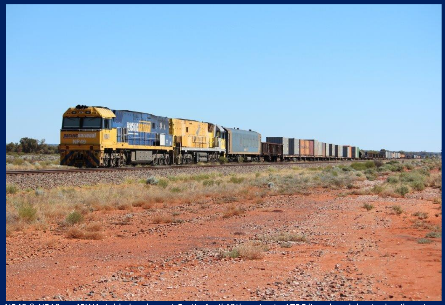
NR49 & NR18 on 4PW4 stabled on loop at Curtin April 13th owing to ATRC line closed due to derailment.