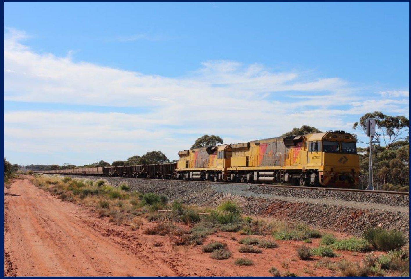
ACC6031 & ACB4401 DPU ACB4403 & AC4303 on 6418 empty ore at Binduli 19/4.