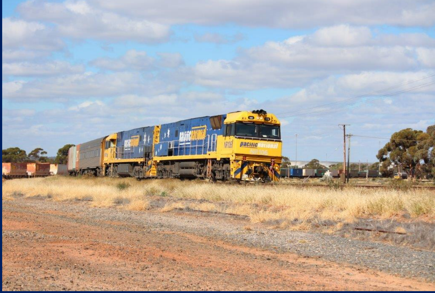
N R106 & NR105 on late 7SP3 departing Parkeston April 21st.