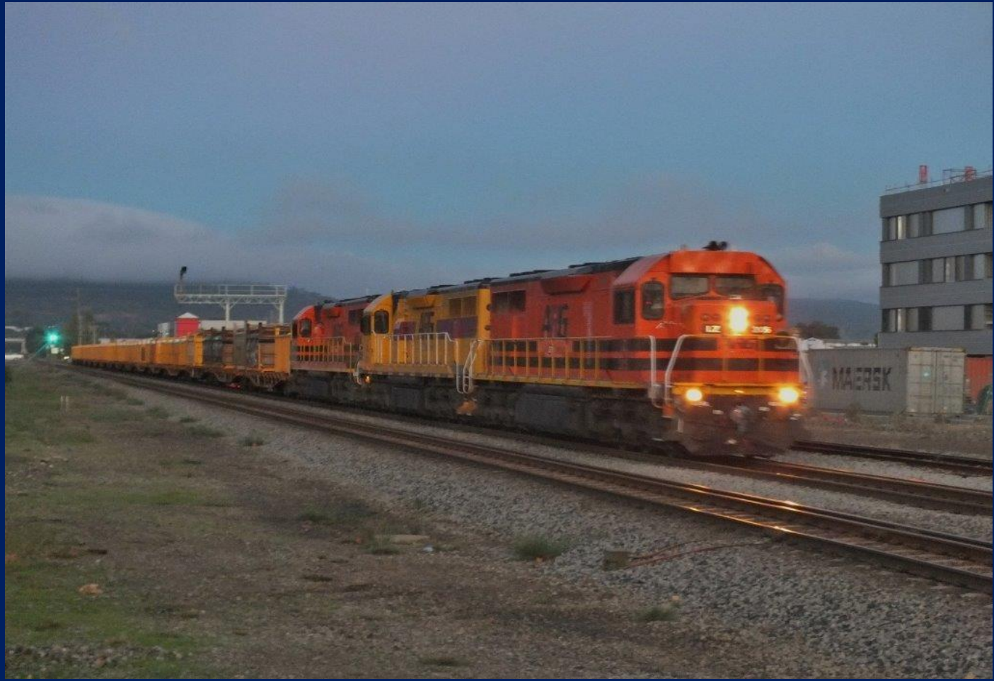
LZ3105, LQ3121 & LZ3117 on 2474 salt train at Midland on sunset May 19th.