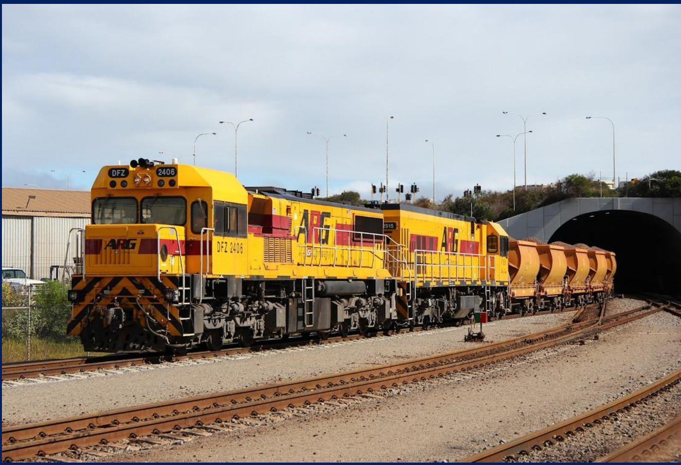
DFZ2406 & P2515 on loaded ore entering Geraldton Port May 6th.