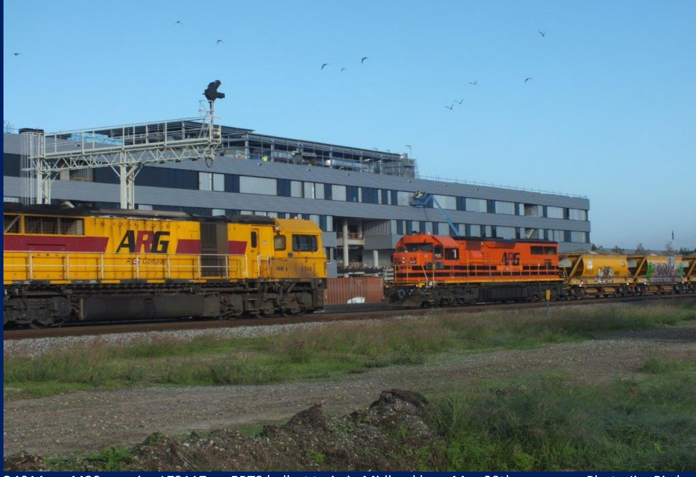
Q4014 on 4430 crossing LZ3117 on 5BT9 ballast train in Midland loop May 29th.