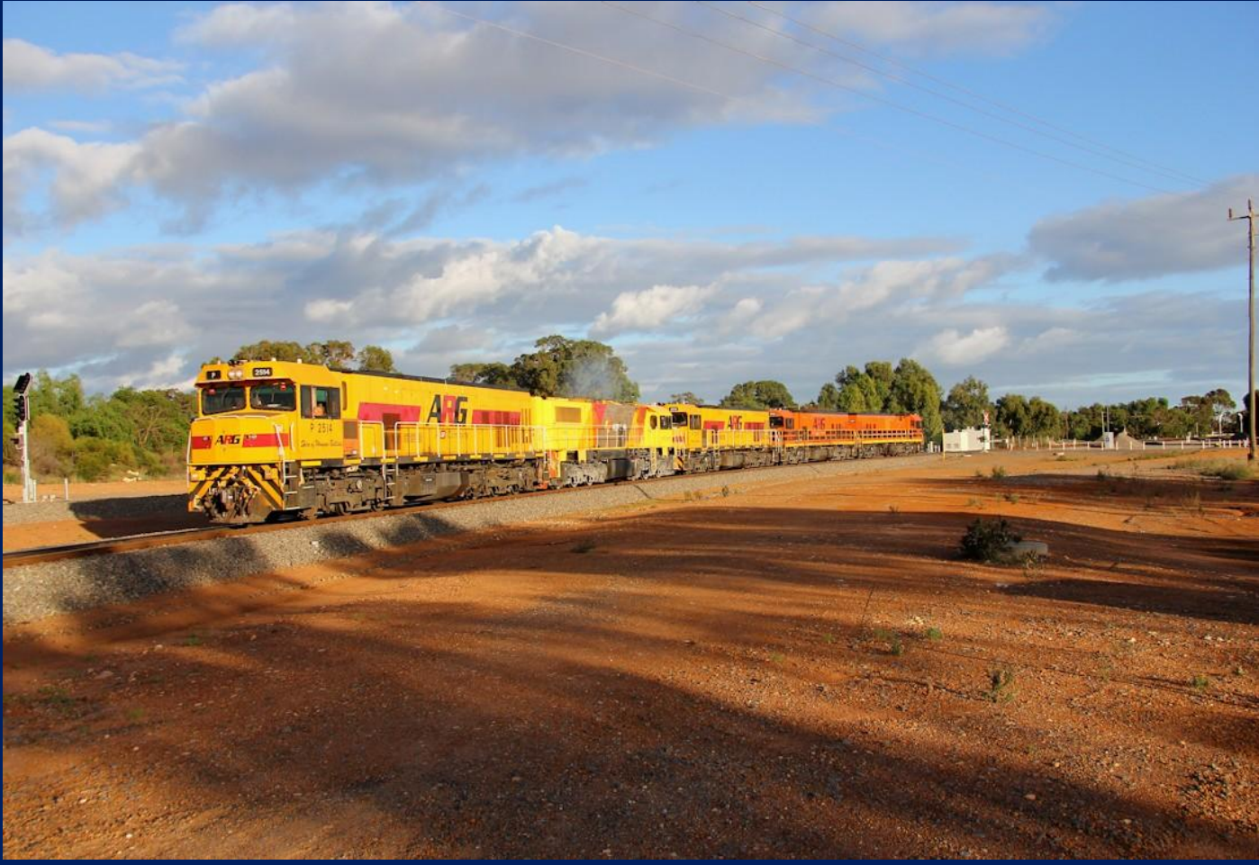
P2514, DFZ2402, P2510, 2512 & P2507 light engine move from Narngulu to Narngulu East for service 27/5.