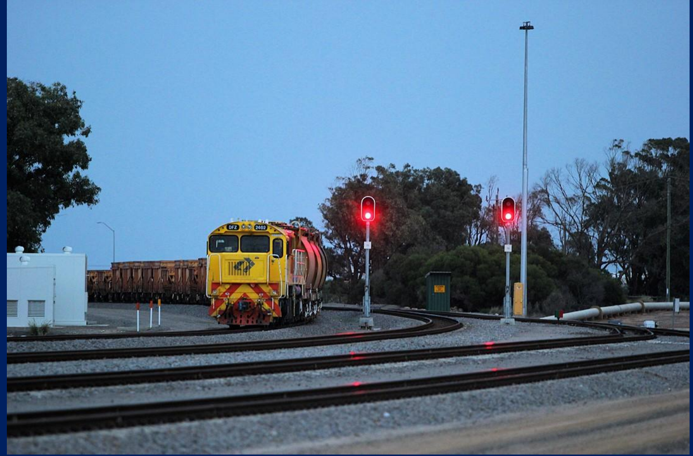
DFZ2402 shunting stored wagons at Narngulu being readied for scrapping 27/5.