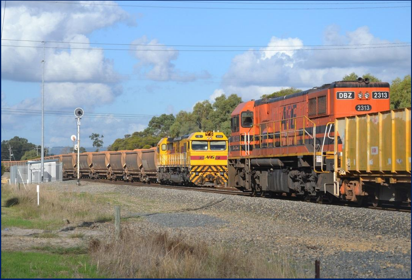
S3302 on bauxite crosses DBZ2313 on ballast in loop Wellard May 10th.