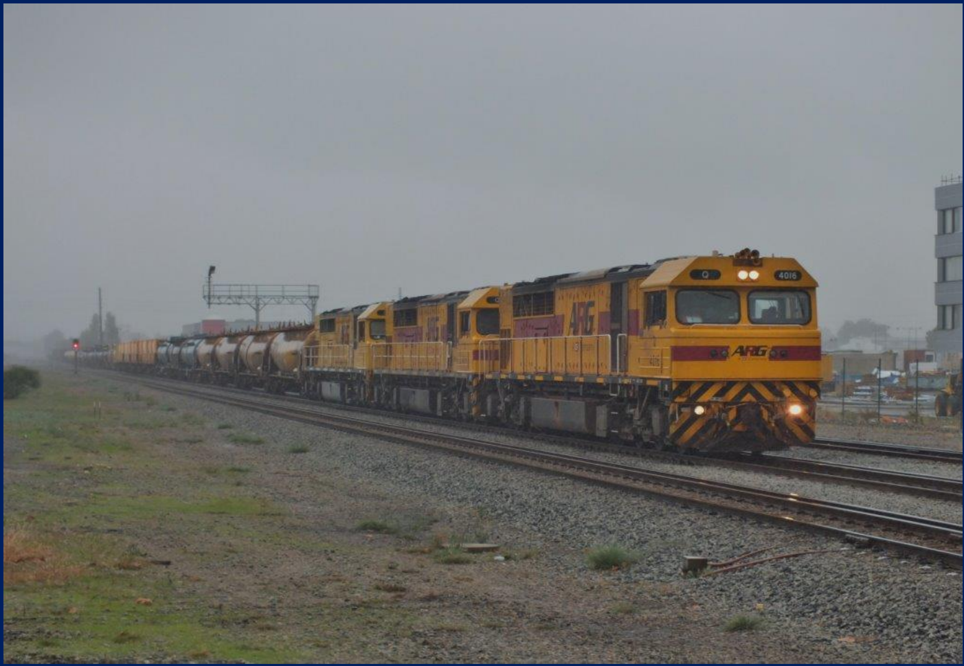
Q4016, Q4014 & Q4011 on late combined 1430 empty suphur/1426 freight Midland 19/5.