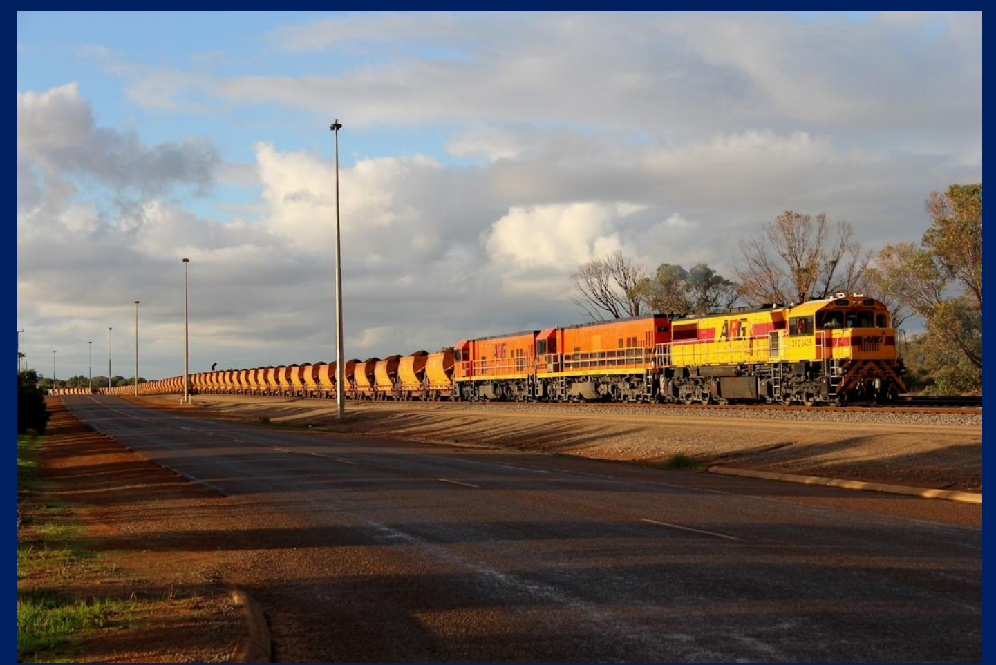
DFZ2404, P2505 & P2516 on Perenjori ore arriving at Narngulu May 10th.