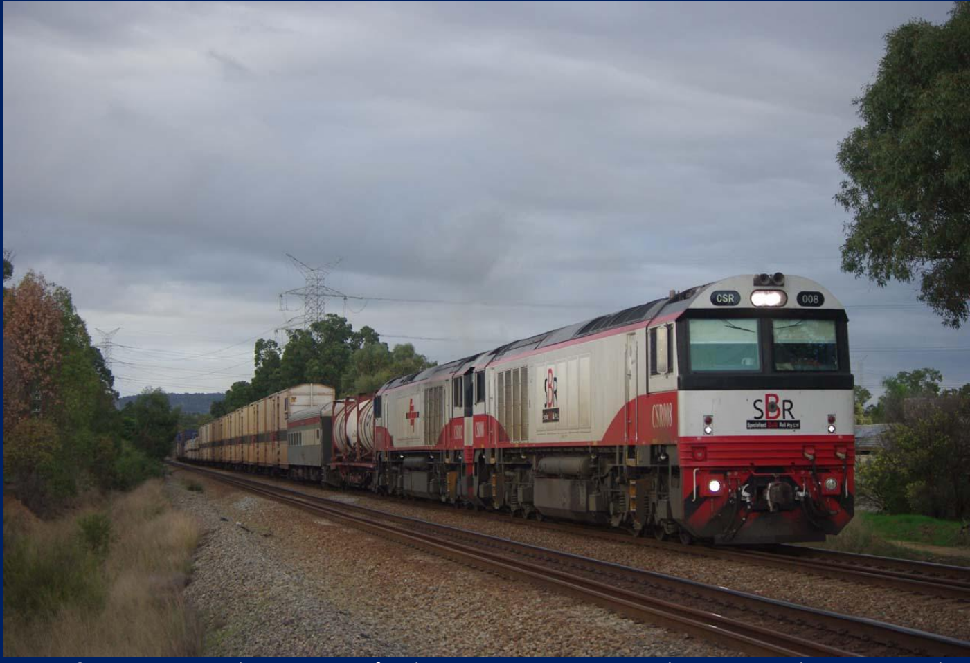
CSR008 & CSR002 on very late 1PM9 SCT freight at Swan View on May 19th.