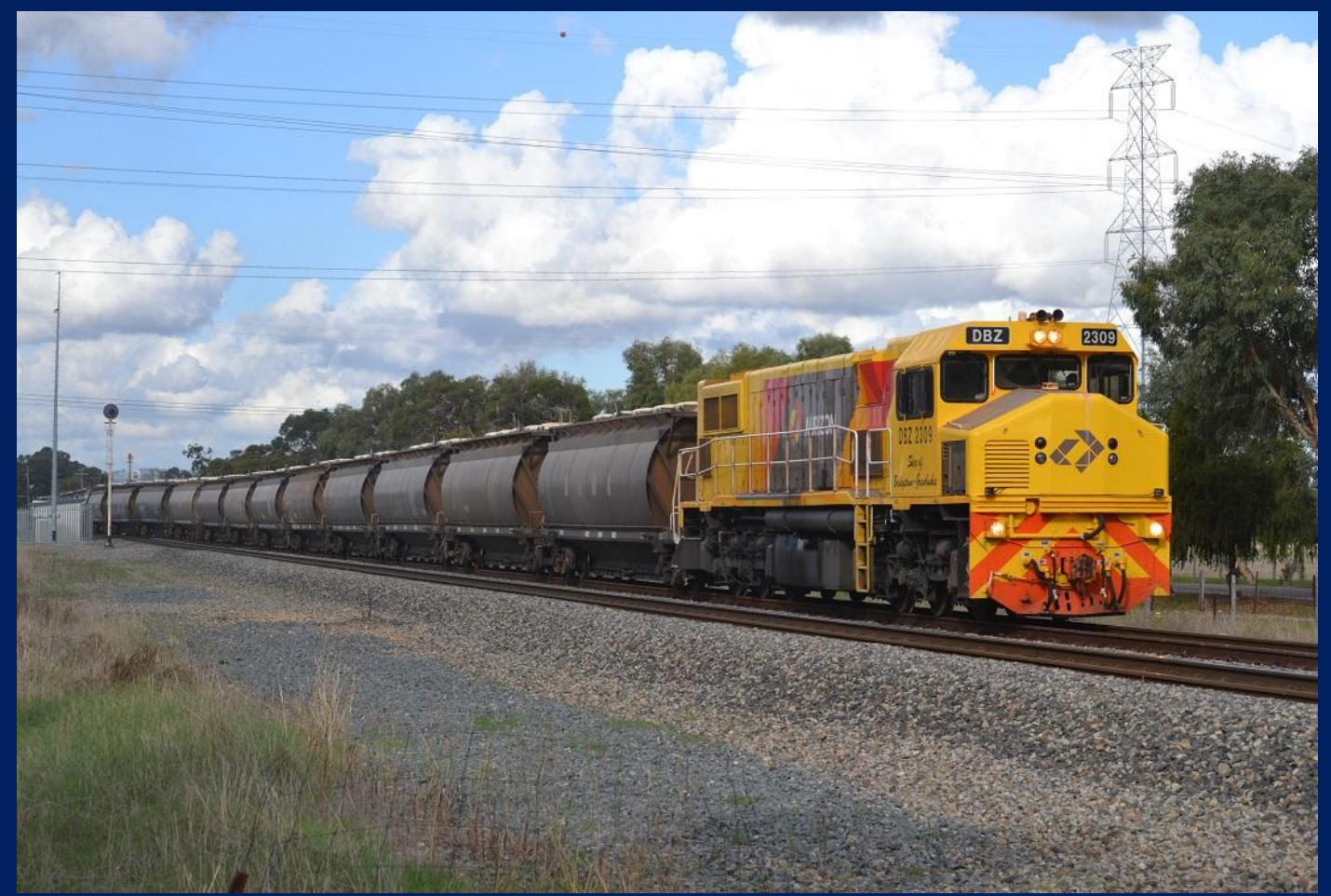
DBZ2309 on late 7222 alumina in loop Wellard May 10th.