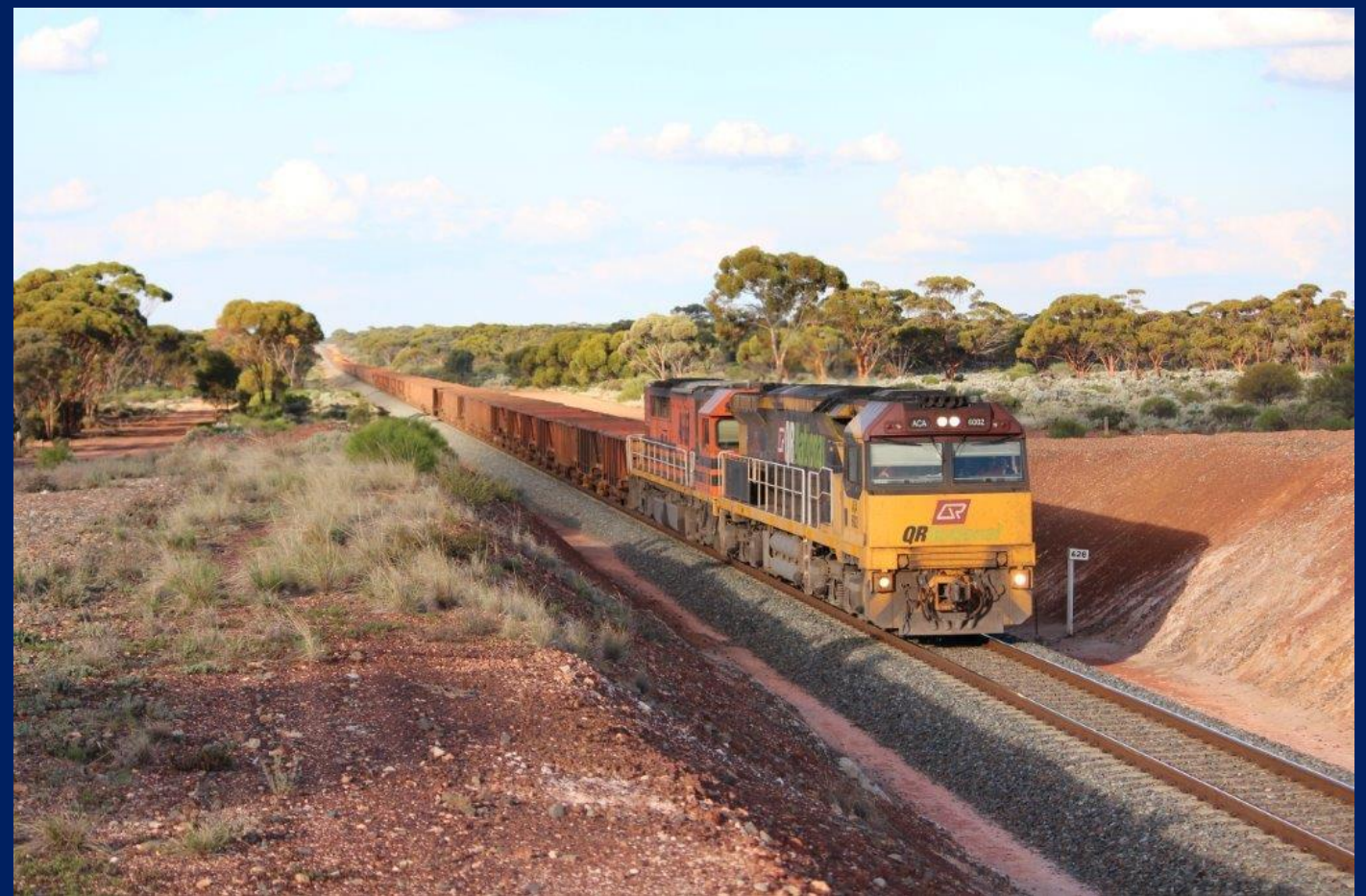
ACA6002 & Q4003 with DPU Q4013 & AC4305 on 7414 empty ore at Bonnie Vale 17/5 moving after being held for 3 days at Hampton owing to derailment closing line further west.