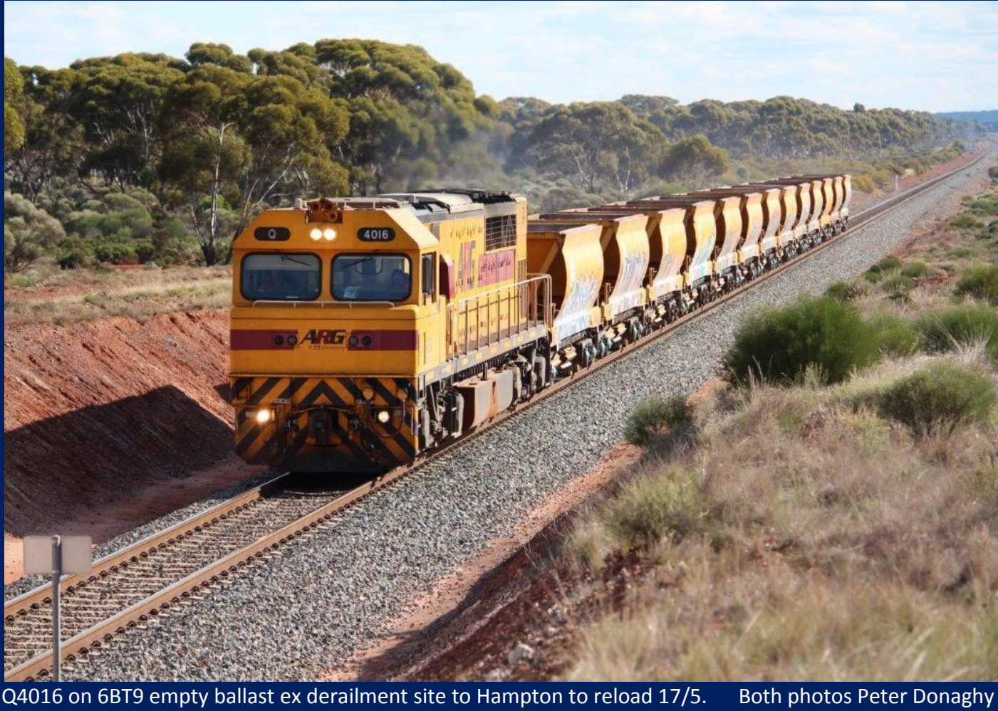
Q4016 on 6BT9 empty ballast ex derailment site to Hampton to reload 17/5.