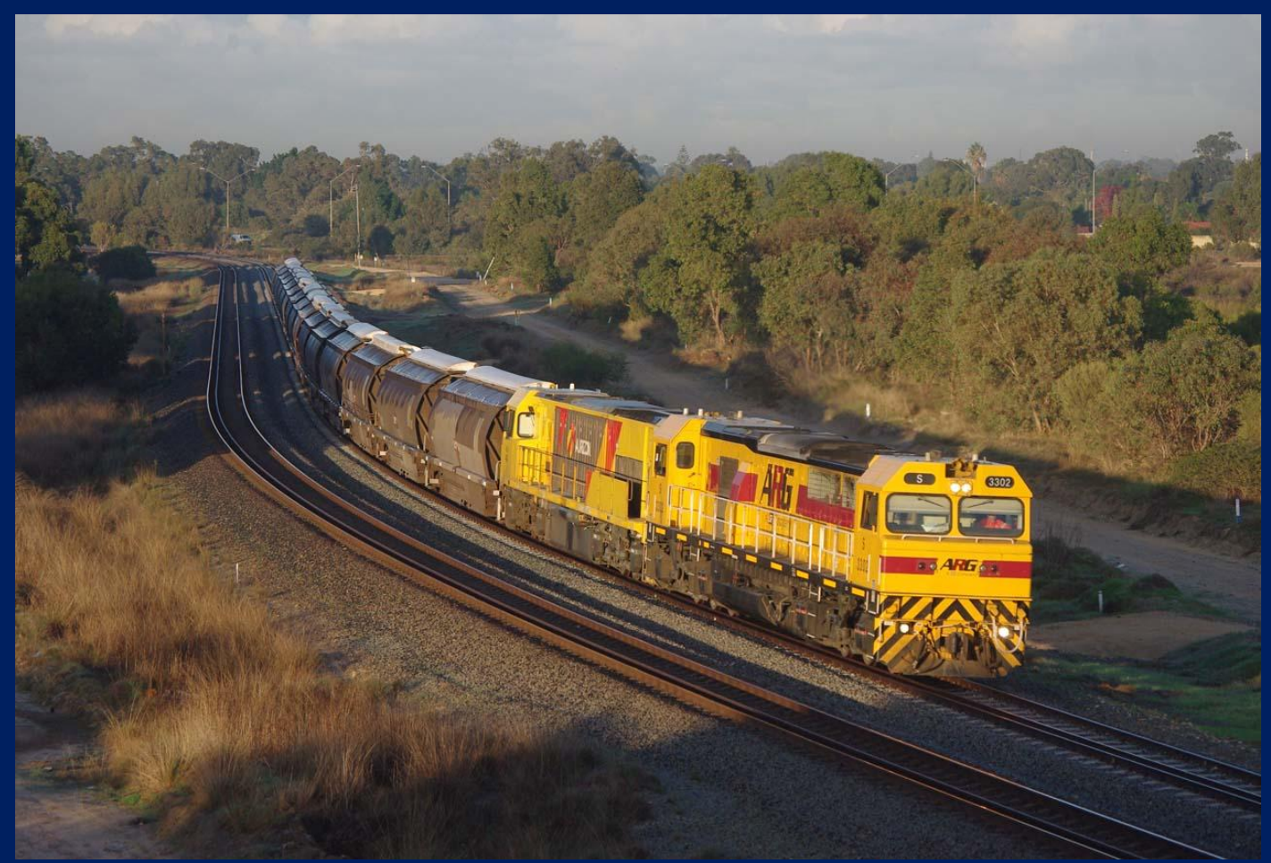
S3302 & ACN4163 on 6121 empty XU grain wagon movement at Wattle Grove 16/5.