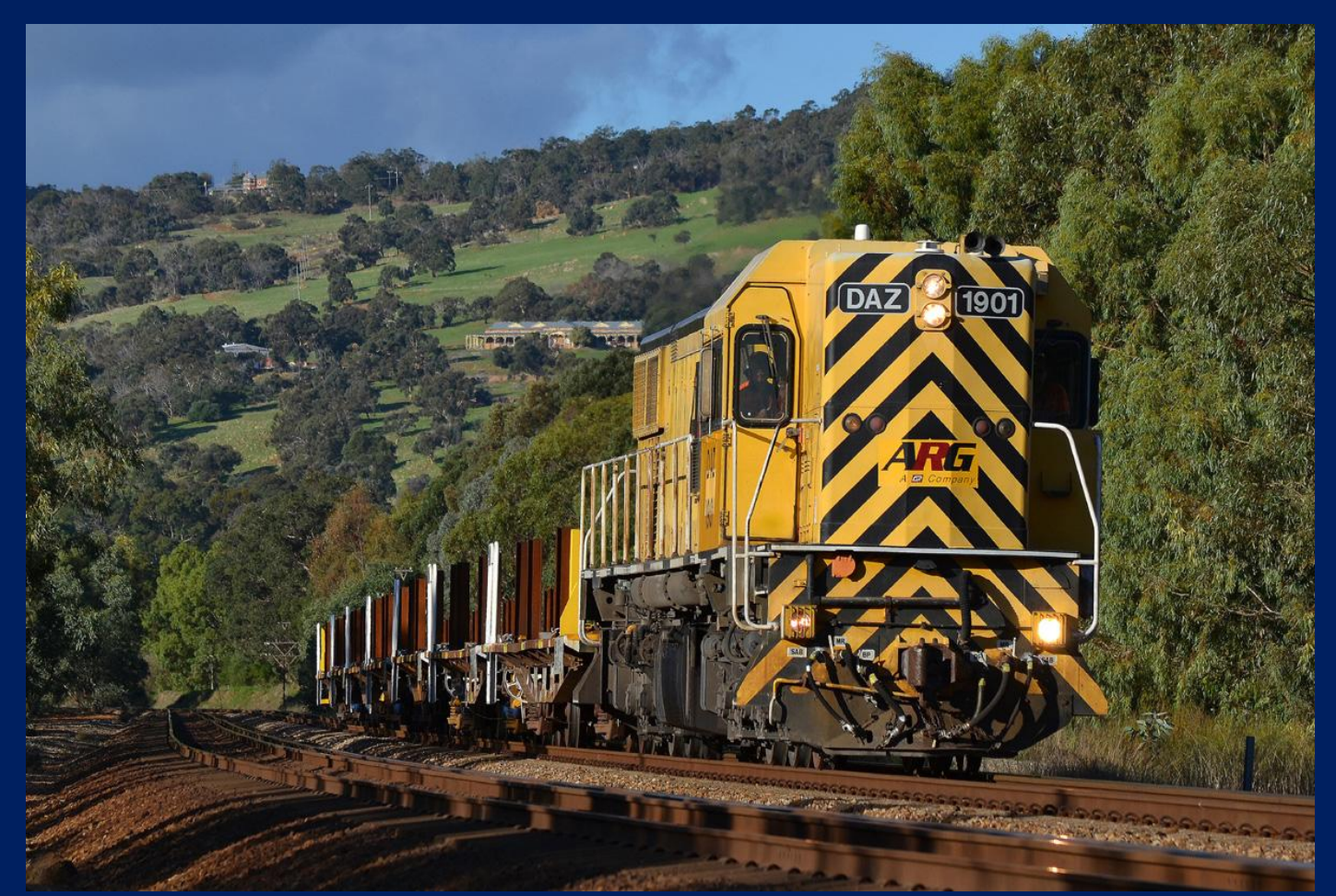
DAZ1901 on 6RT2 empty rail train on its way back to flashbutt at Brigadoon 16/5.