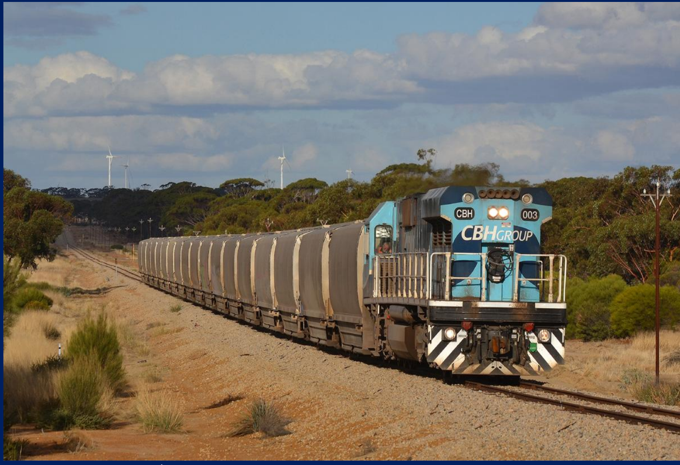
CBH003 on 2M53 Watco/CBH grain ex Narembeen at Collgar April 28th.