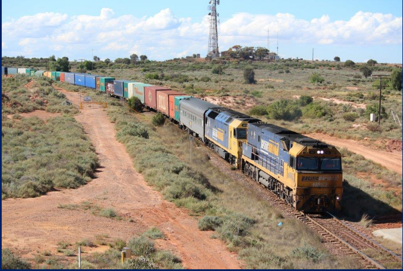
NR63 & AN11 on 5SP5 intermodal approaching Kalgoorlie May 18th.