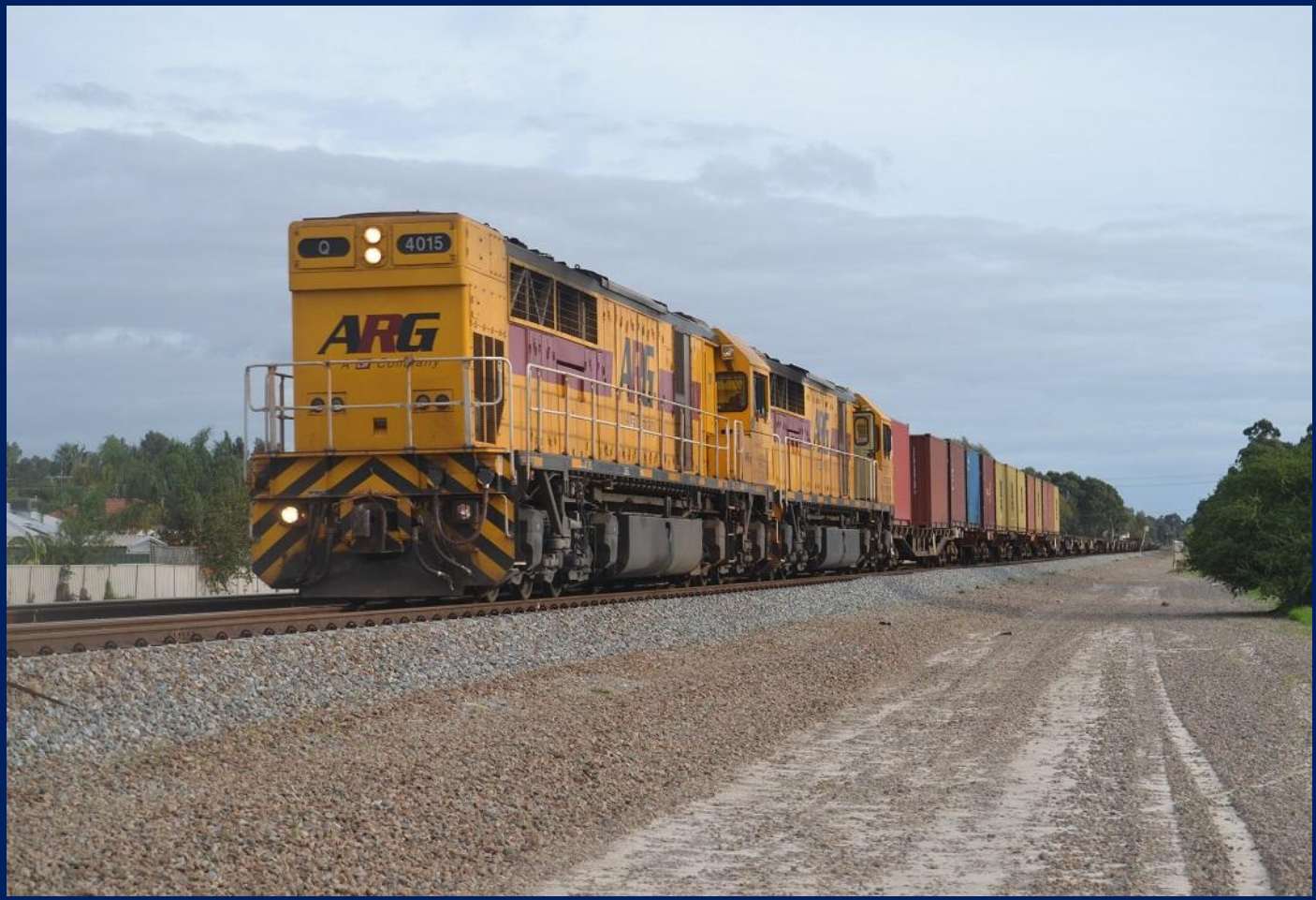
Q4015 with failed Q4006 on 2195 container train at Thornlie May 26th.