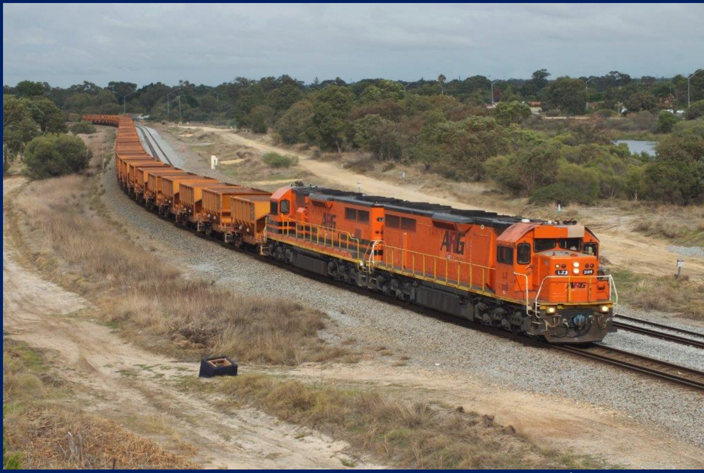
LZ3109 & LZ3117 on 4035 empty ore ex Kwinana running wrong line at Wattle Grove 7/5.