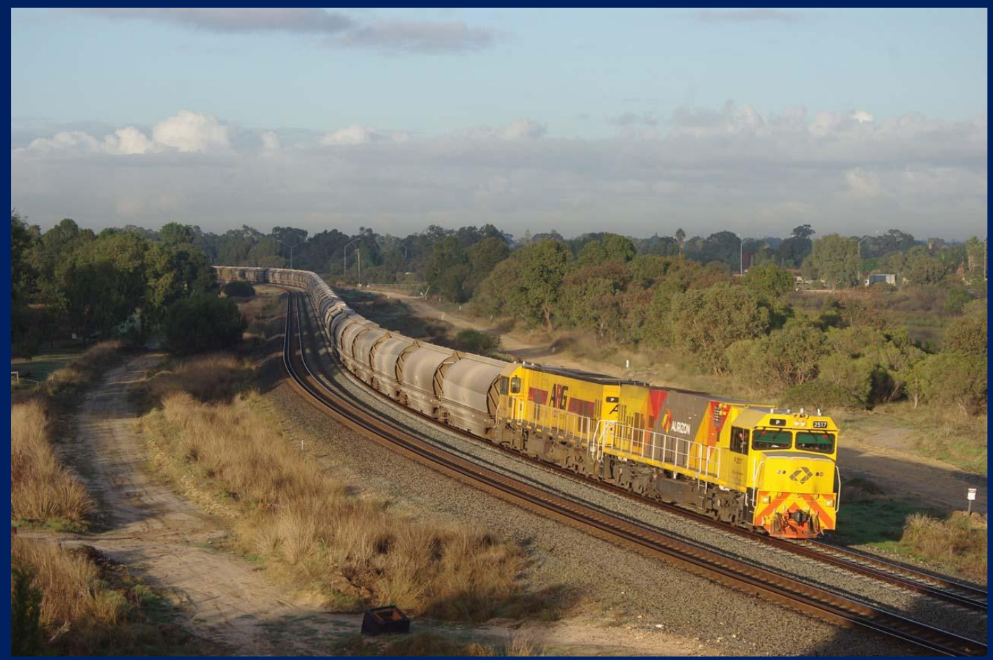
P2517 & P2511 on 6K93 empty Watco/CBH grain at Wattle Grove May 16th.