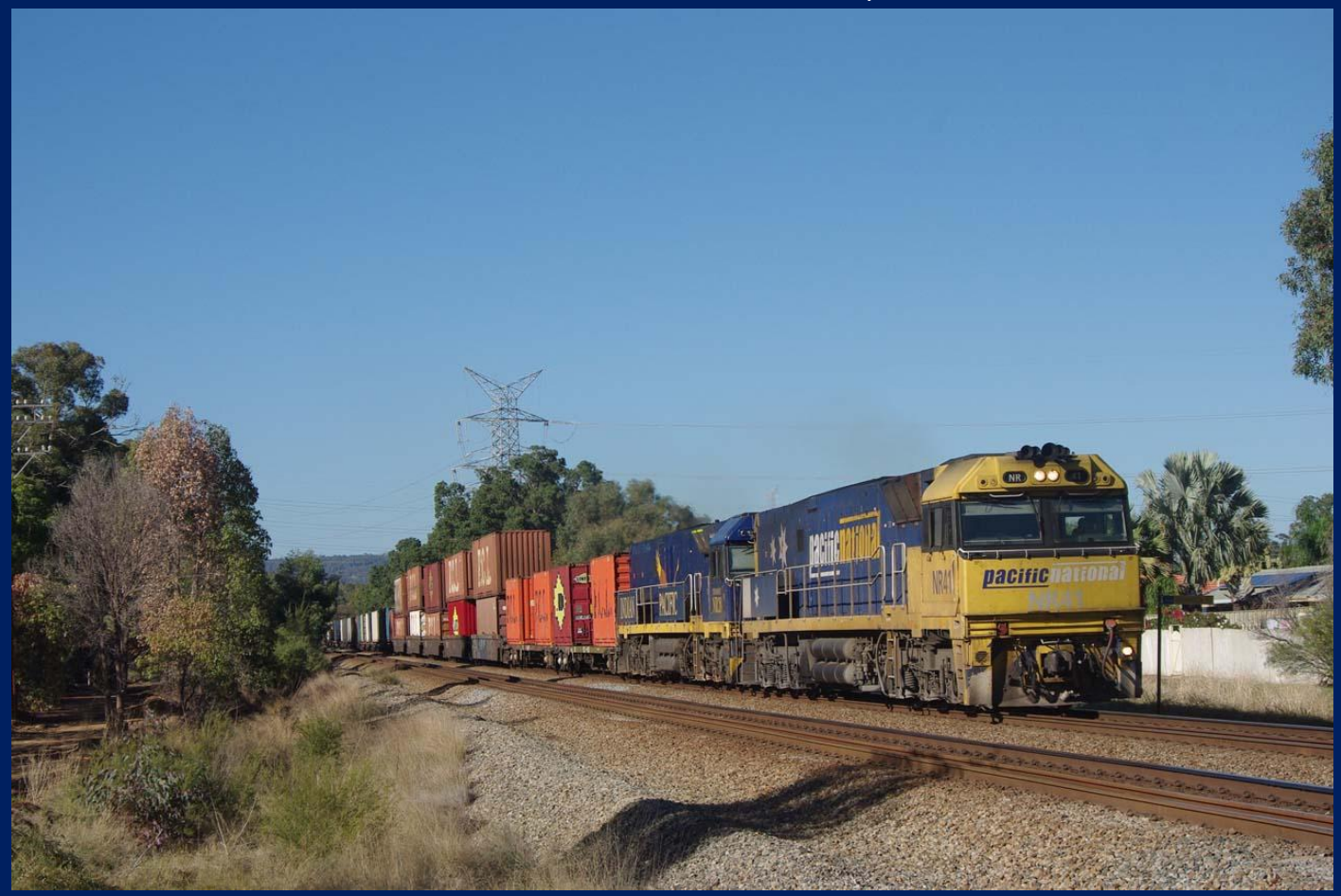
NR41 & NR28 on 1PS6 intermodal at Swan View May 11th.