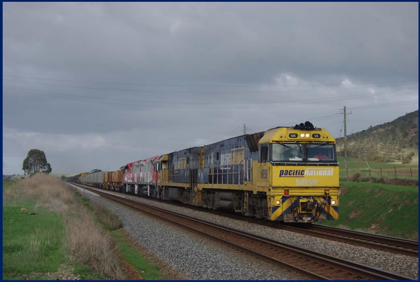
NR59, NR105 [dead] MRL001 & MRL003 on delivery run to WA on 4WP2 Katrine 25/5.