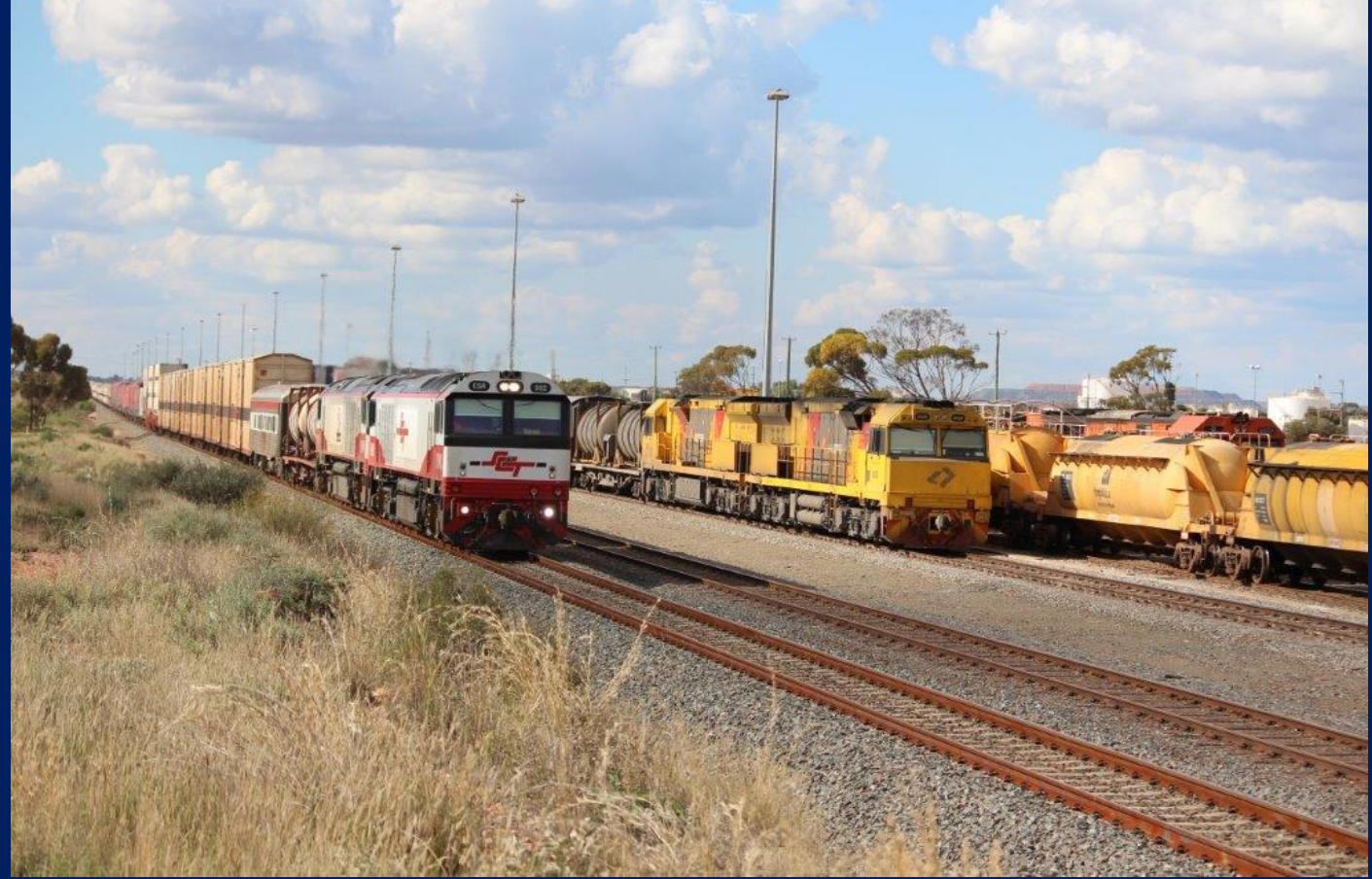
CSR002 & CSR008 on 2MP9 SCT freight, passing 6028 & 6029 on 2PM1 Aurizon intermodal stabled in West Kalgoorlie yards waiting line to Perth to reopen following repair 17/5.