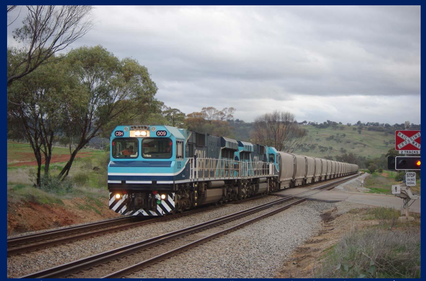
CBH009 & CBH003 on 6K23 wrong line running in Avon Valley owing to rail grinding on down main 4/7.