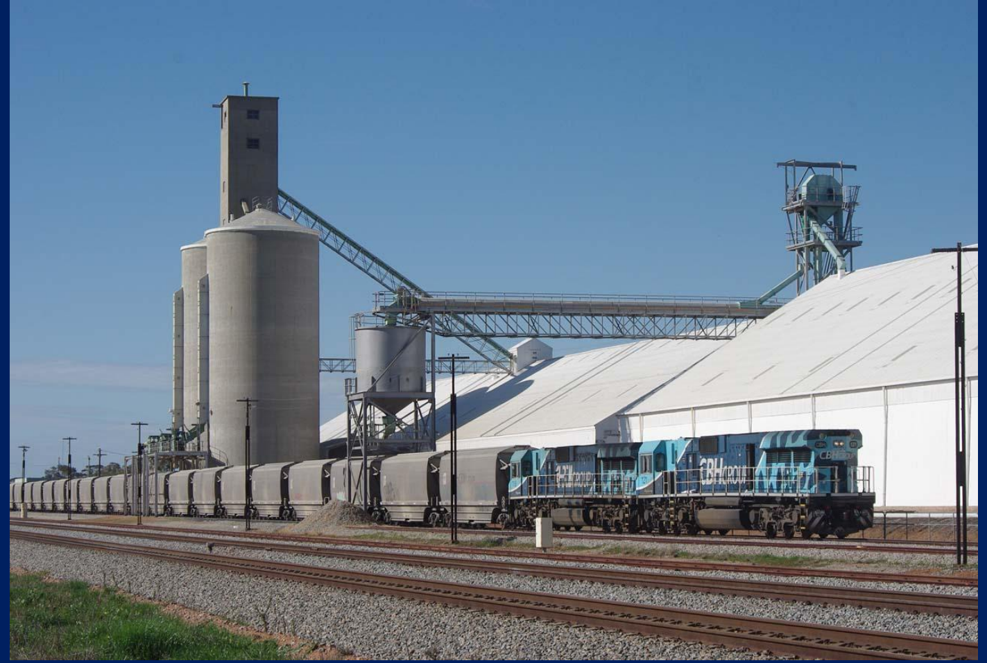
CBH121 & CBH118 on 6S56 Watco/CBH grain loading at Cunderdin grain silo July 18th.