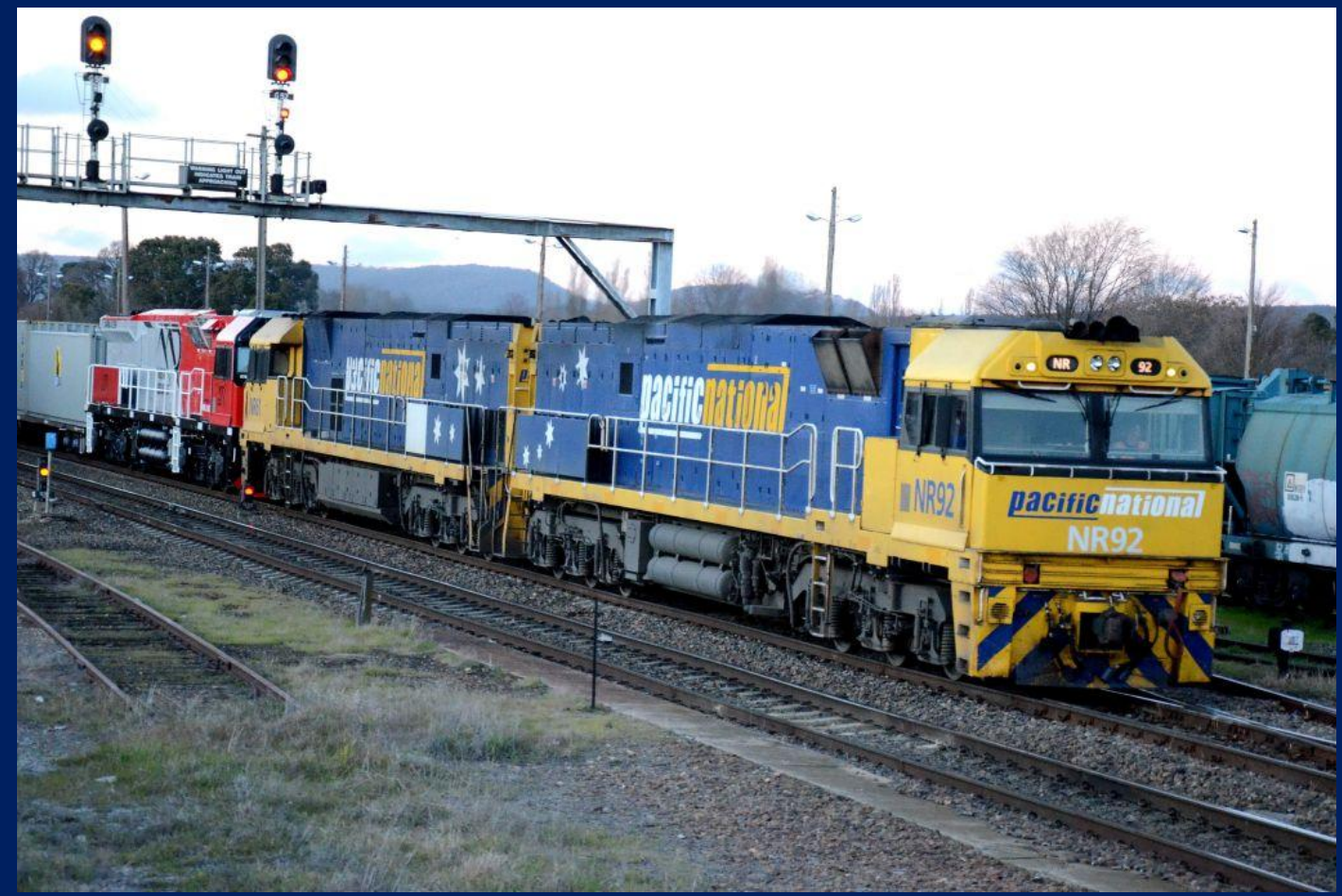
NR92 & NR61 hauling dead MRL005 on delivery to WA on 5NY3 steel Goulburn 17/7.