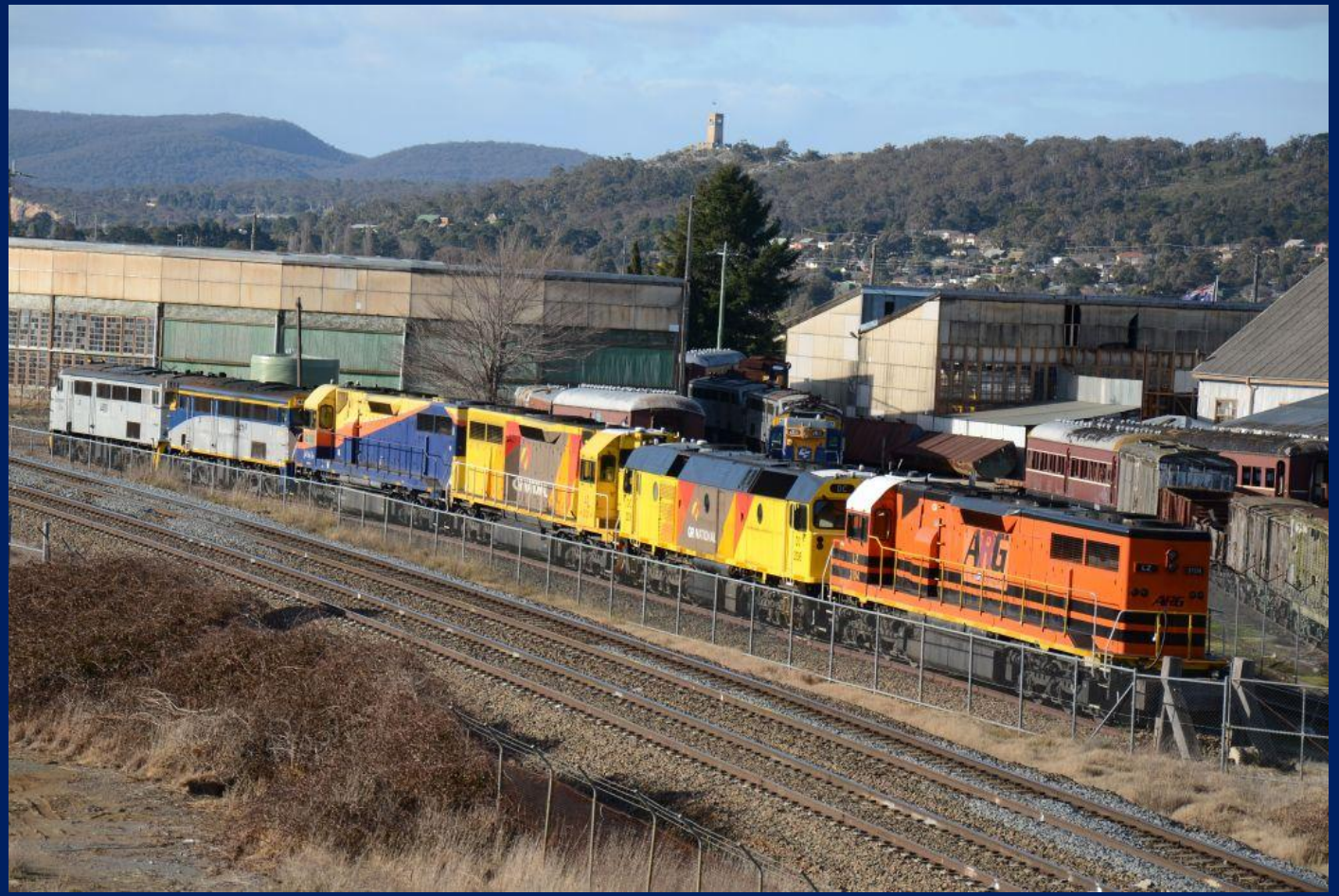
Stored Aurizon locomotives LZ3104, DC2206, LZ3101 & LQ3122 at Goulburn NSW 19/7.