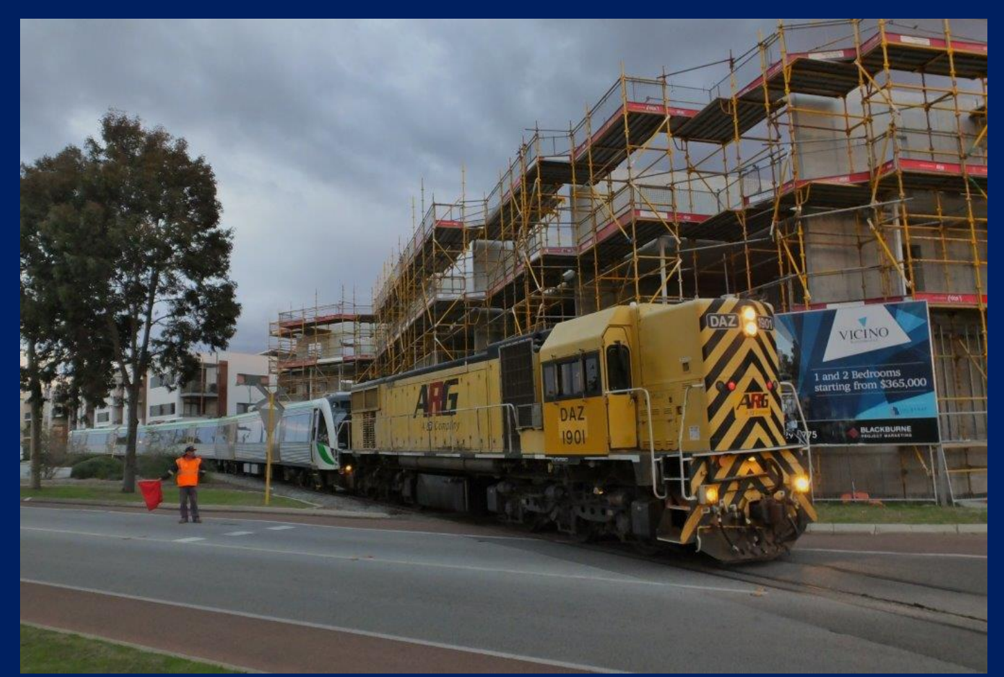
DAZ1901 hauling EMU set #100 past new apartment block under construction in old workshops yard 11/7