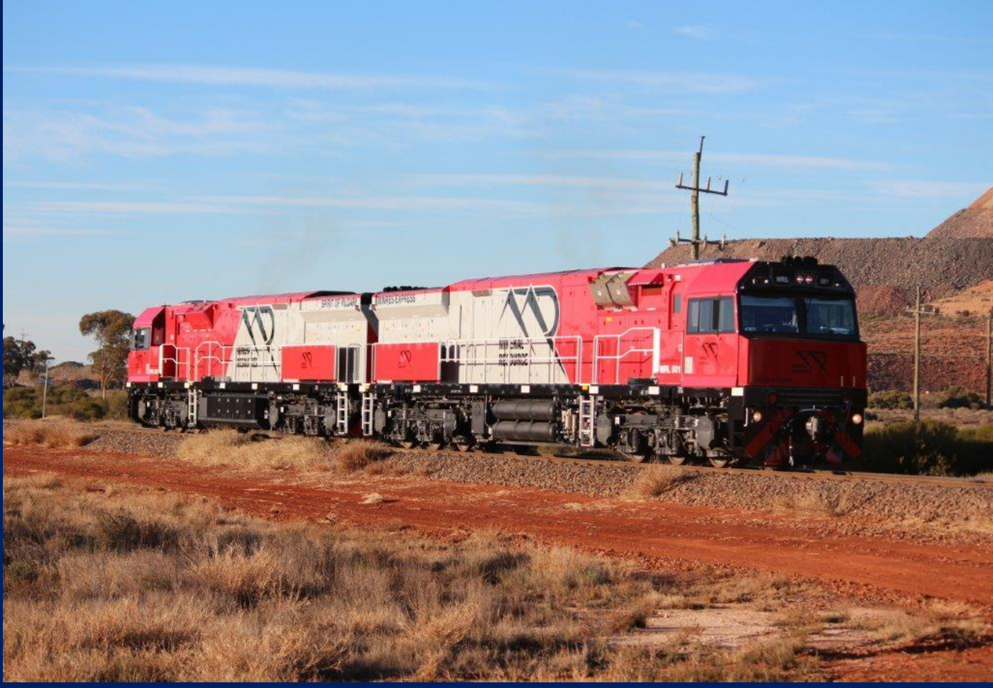
MRL001 & MRL002 shunting onto stored MHPY ore cars at Parkeston July 6th.