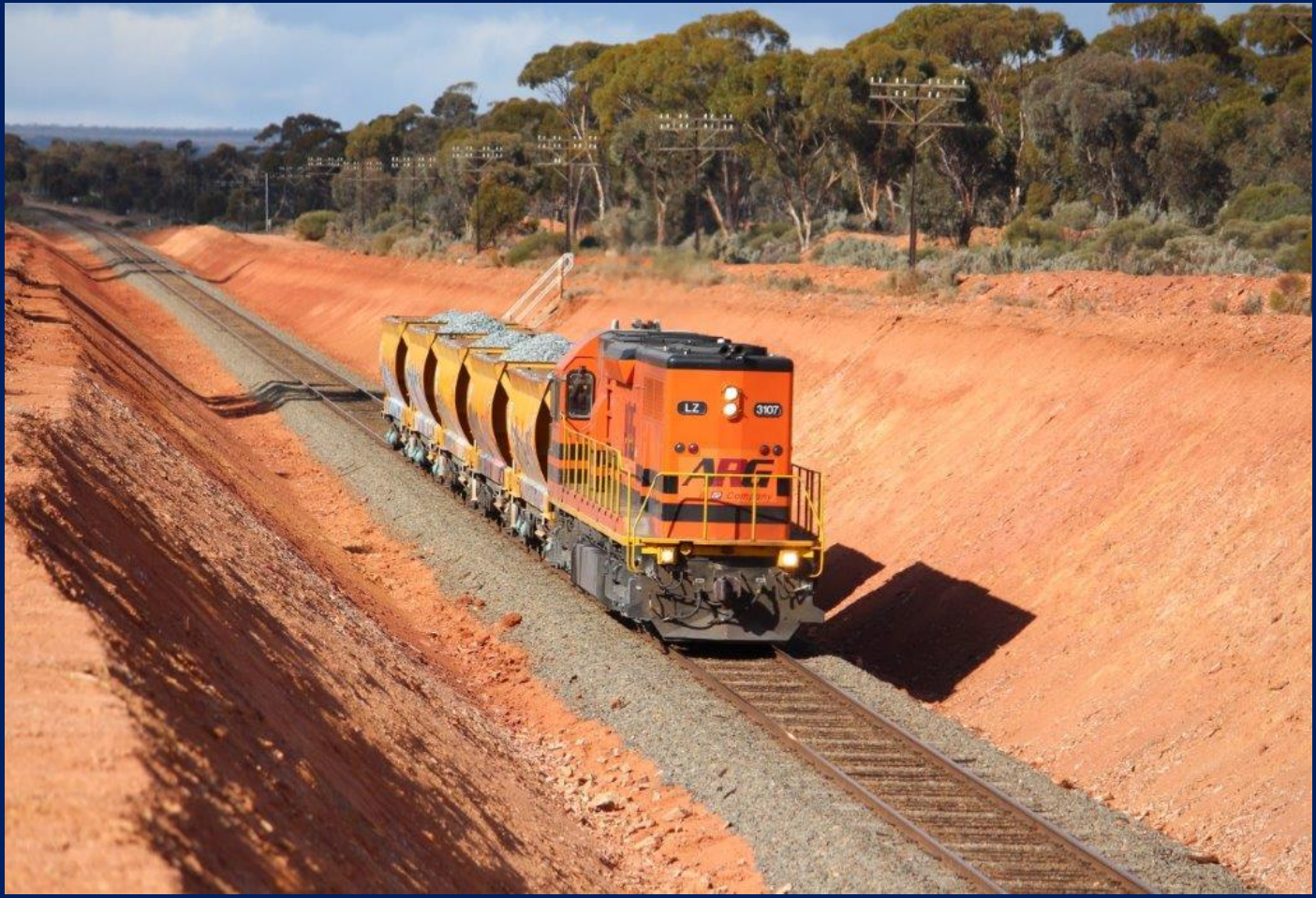
LZ3107 on 7BT4 ballast train at Binduli running to ballast recent resleepering 12/7.