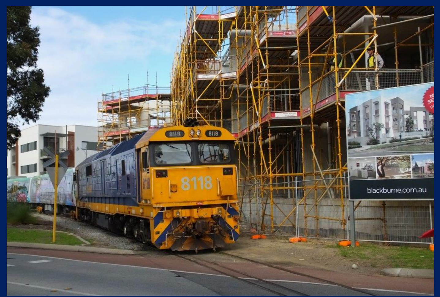
8118 propelling new PTA EMU set #101 past apartment block under construction at Midland July 25th.