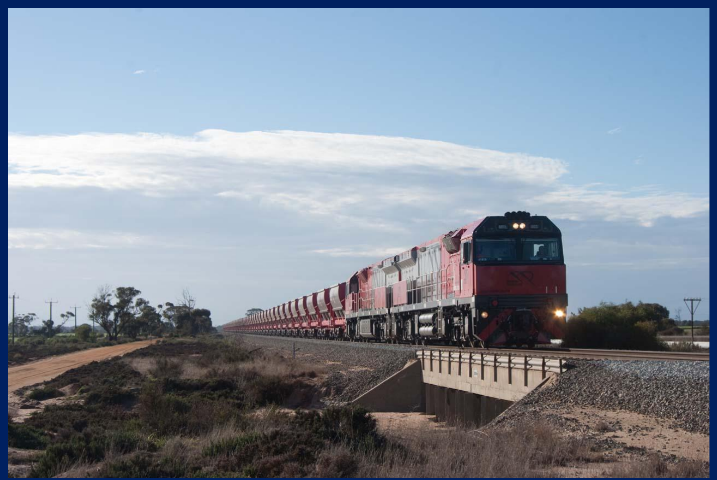
MRL003 & MRL004 on 6032 MRL ore at Kellerberrin July 18th.