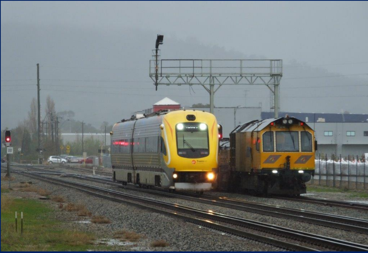
7484 Prospector service from Kalgoorlie passes MMY32 rail grinder in Midland loop July 26th.