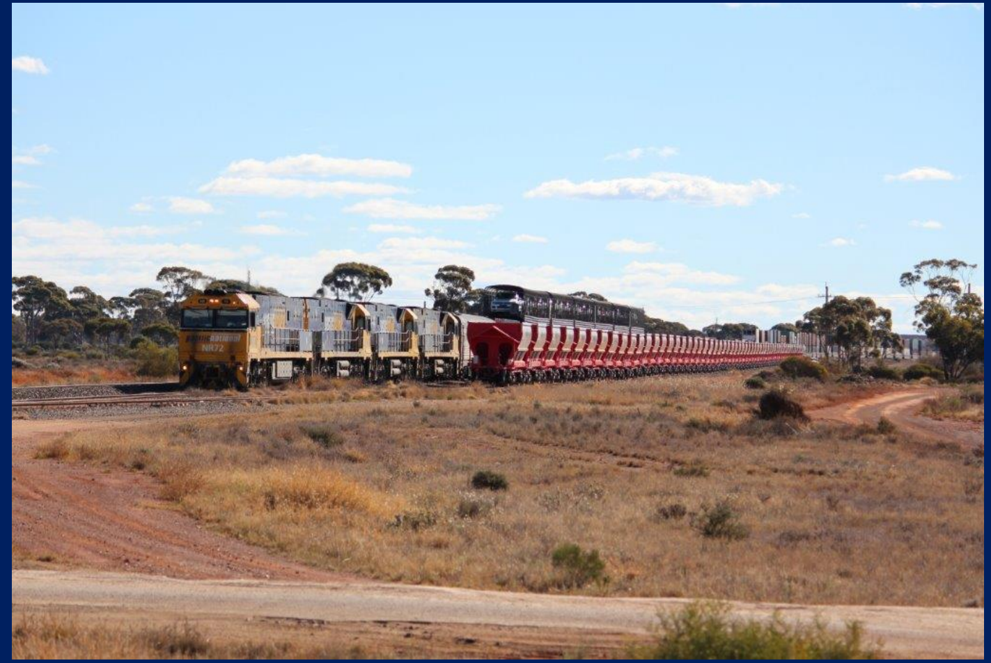
Rake of 58 new Mineral Resources MHPY ore cars stored in Engineers Siding Parkeston 5/7.