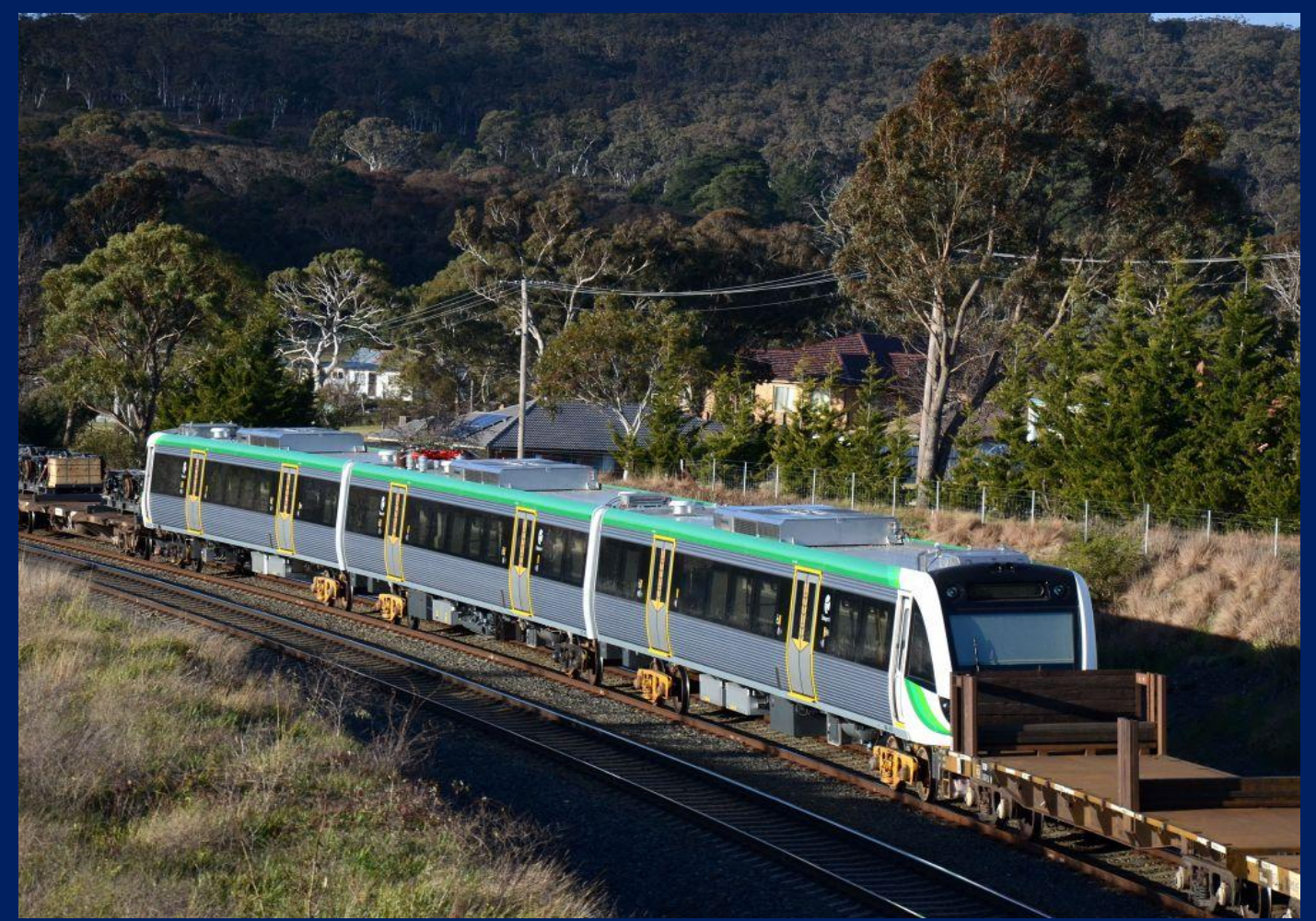
New PTA EMU set #101 on rear 6NY3 steel train passing thru Goulburn NSW July 18th.