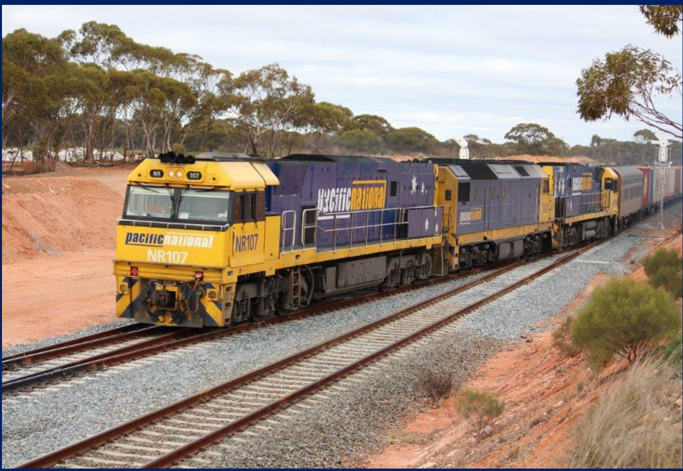
NR107, DL41 & NR16 on 6PM7 entering West Kalgoorlie July 12th.