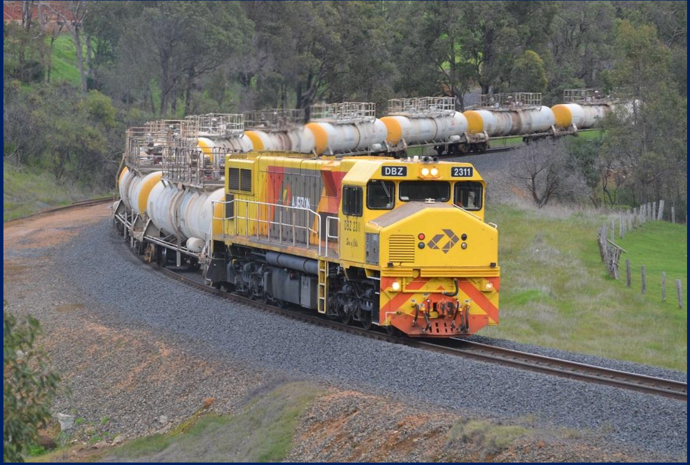
DBZ2311 on 1823 caustic tankers Olive Hill on Collie line July 20th.