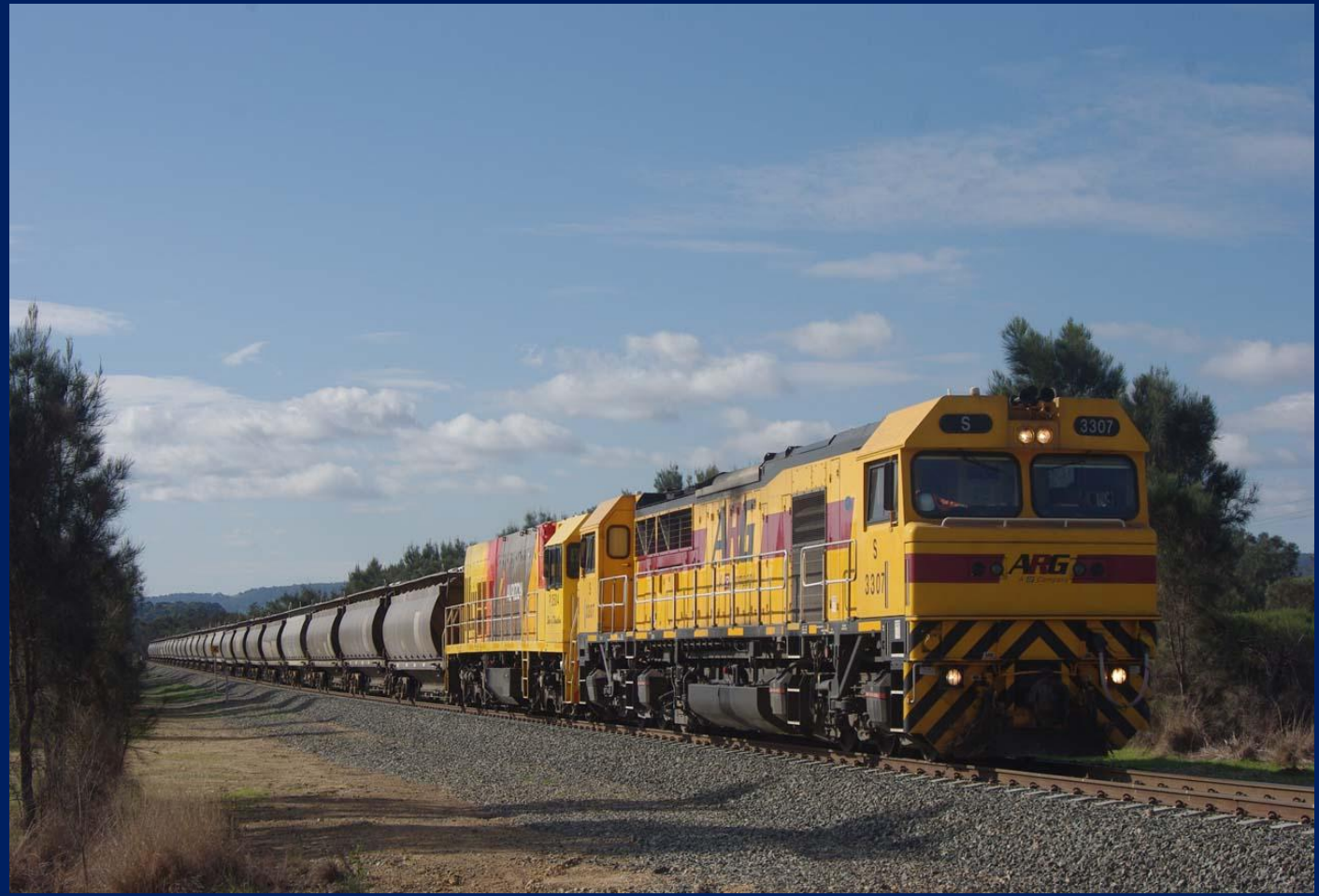
S3307 & P2504 on 5223 empty alumina at Serpentine July 10th.