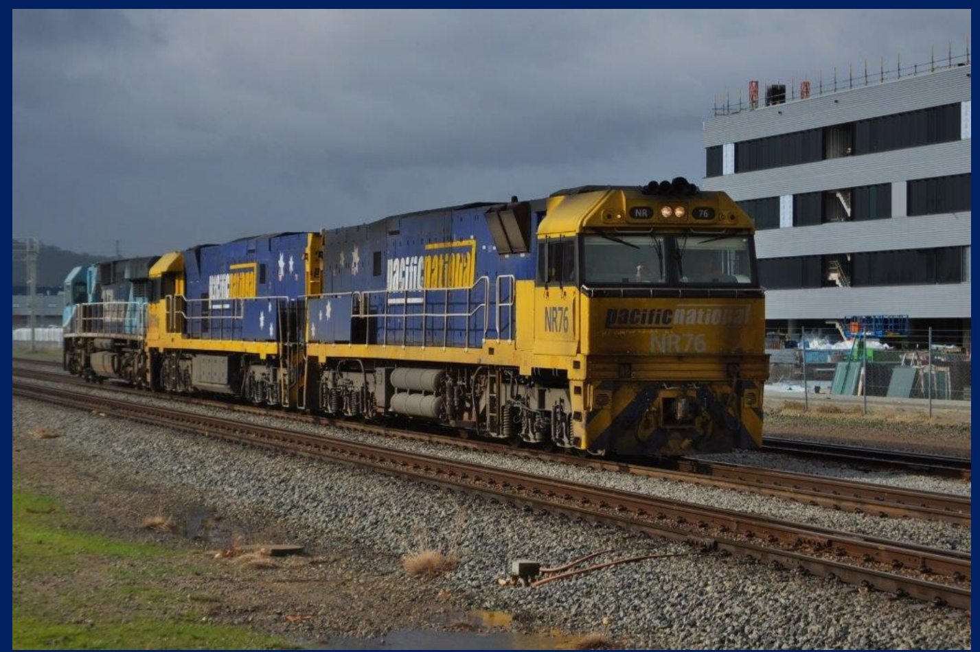
NR76 & NR116 hauling failed CBH118 away from Lloyd Street Midland, to clear the line July 7th.