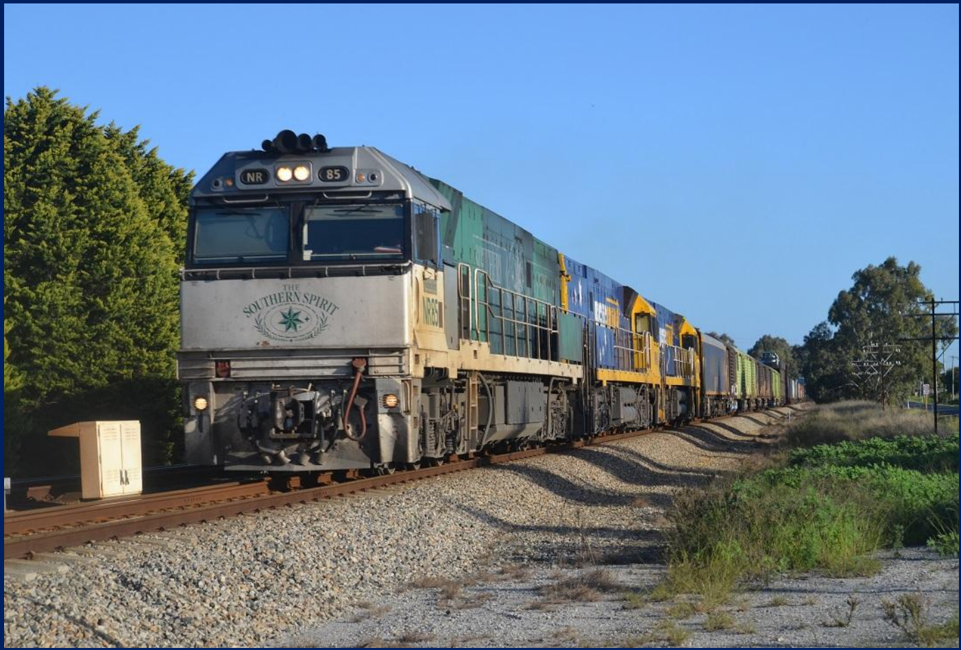
NR85, NR94 & NR98 on 5PM5 intermodal at Millendon July 31st.