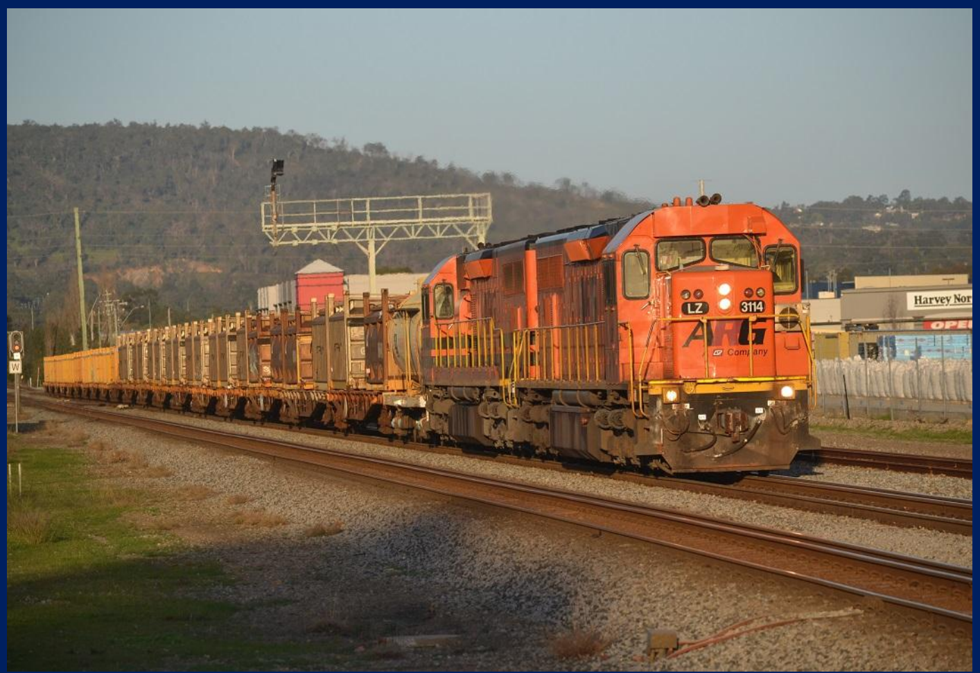
LZ3114 & LZ3117 on 5474 salt at Midland July 31st.