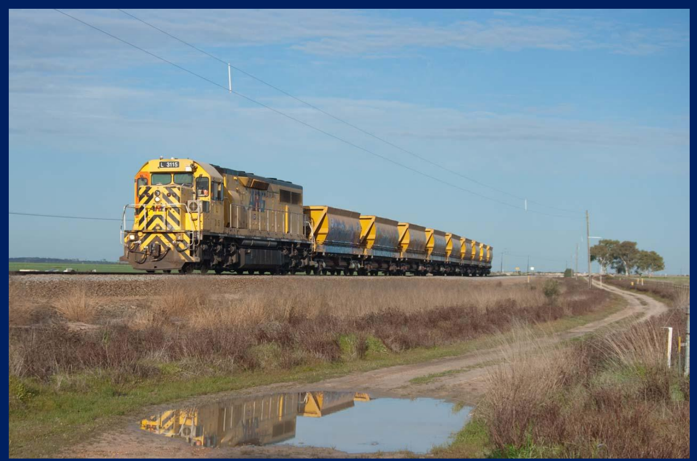
L3115 on 6B13 empty ballast at Kellerberrin July 18th.