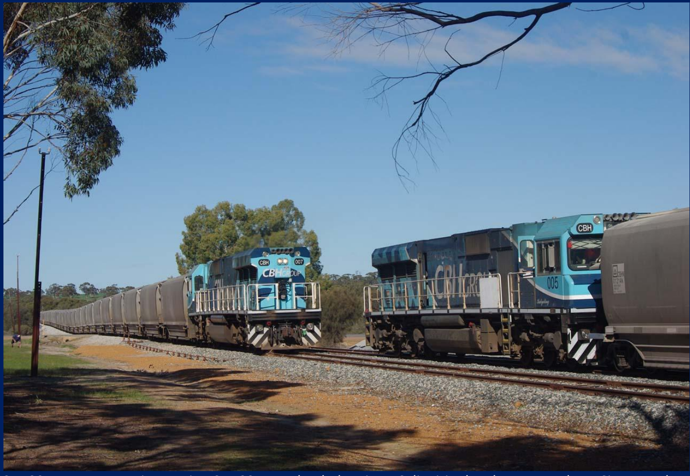
CBH007 on empty grain crossing CBH005 on a loaded grain at Calingiri July 4th.