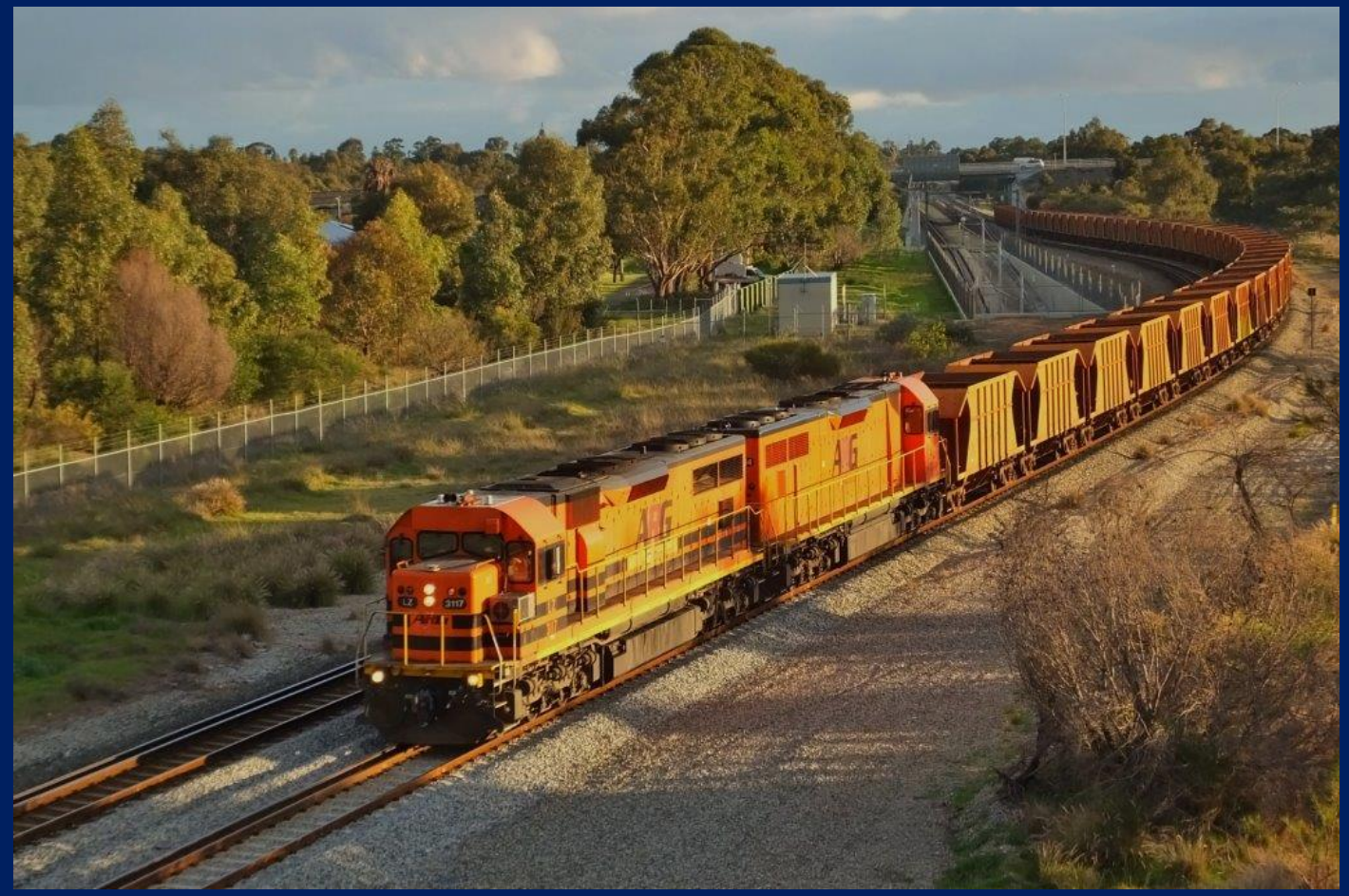
LZ3117 & LZ3114 on 3037 empty ore at Kenwick July 29th.