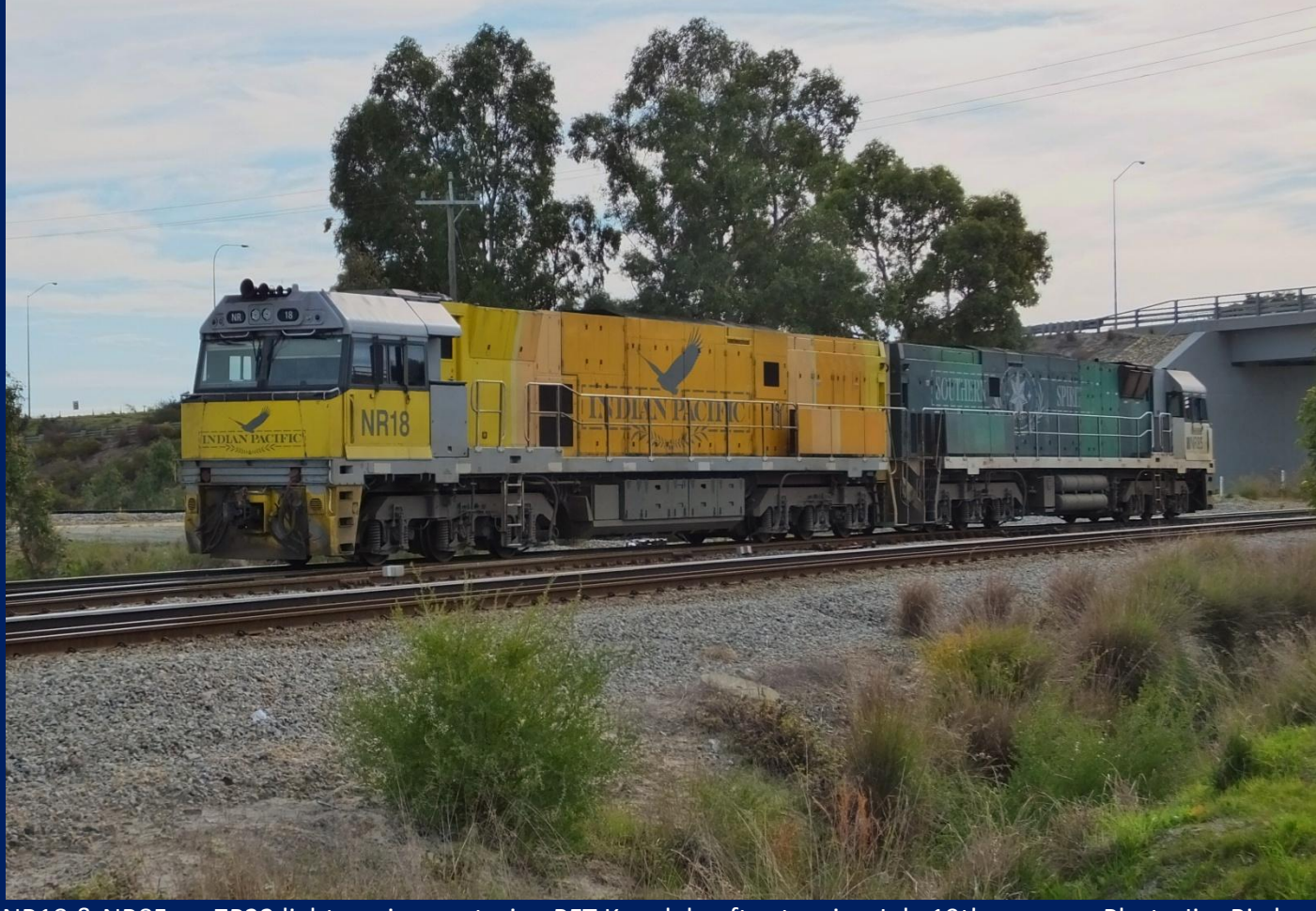
NR18 & NR85 on 7P22 light engines entering PFT Kewdale after turning July 19th.