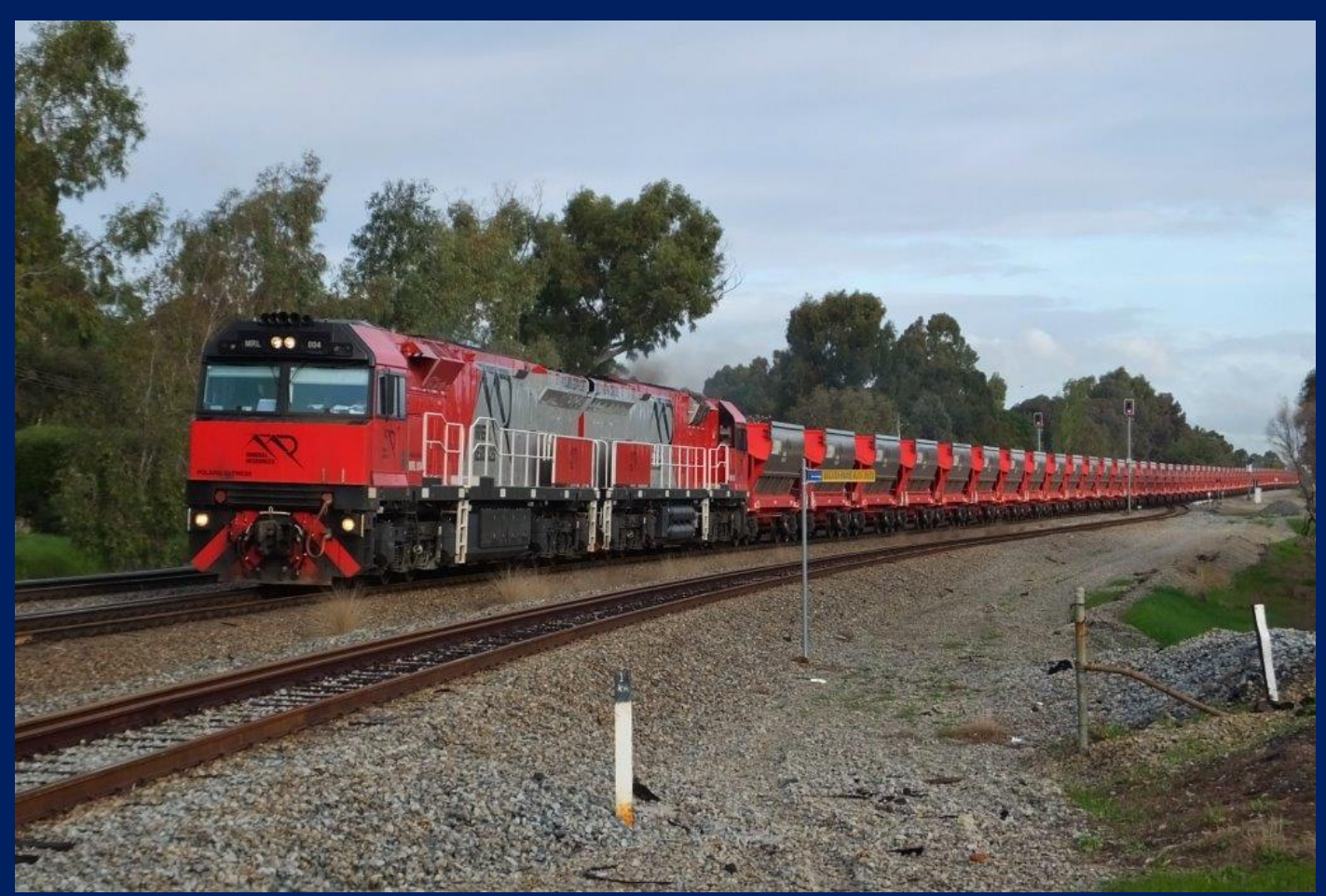
MRL004 & MRL003 on 2033 empty MRL ore Woodbridge July 21st.