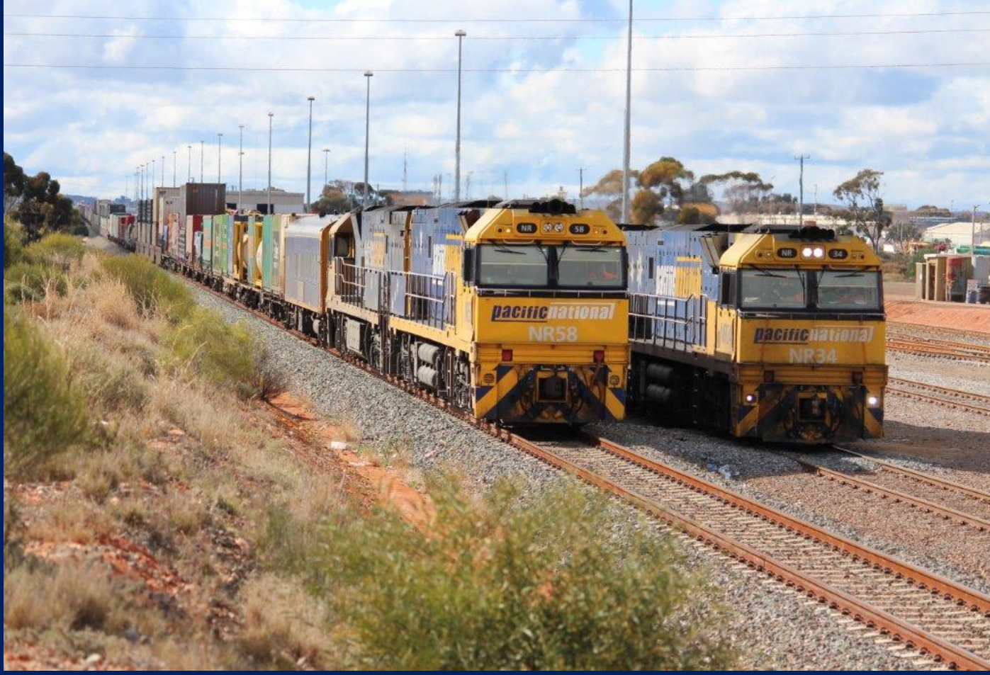
NR58 & NR97 on 6MP4 being overtaken by NR34 & NR79 on 6MP7 at West Kalgoorlie July 20th.