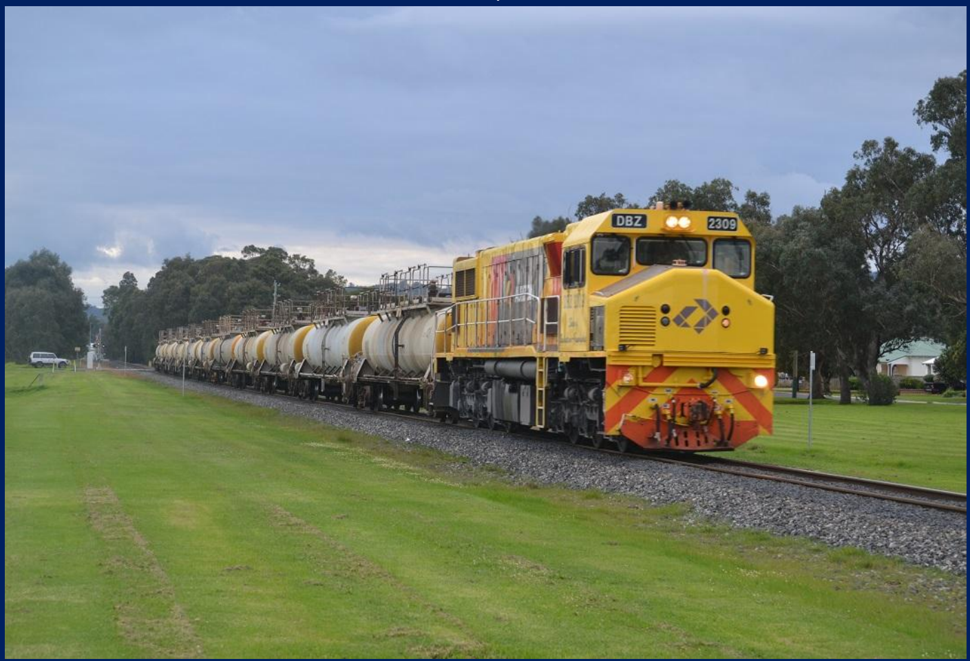
DBZ2309 on 1903 caustic tankers running thru Harvey on July 20th.