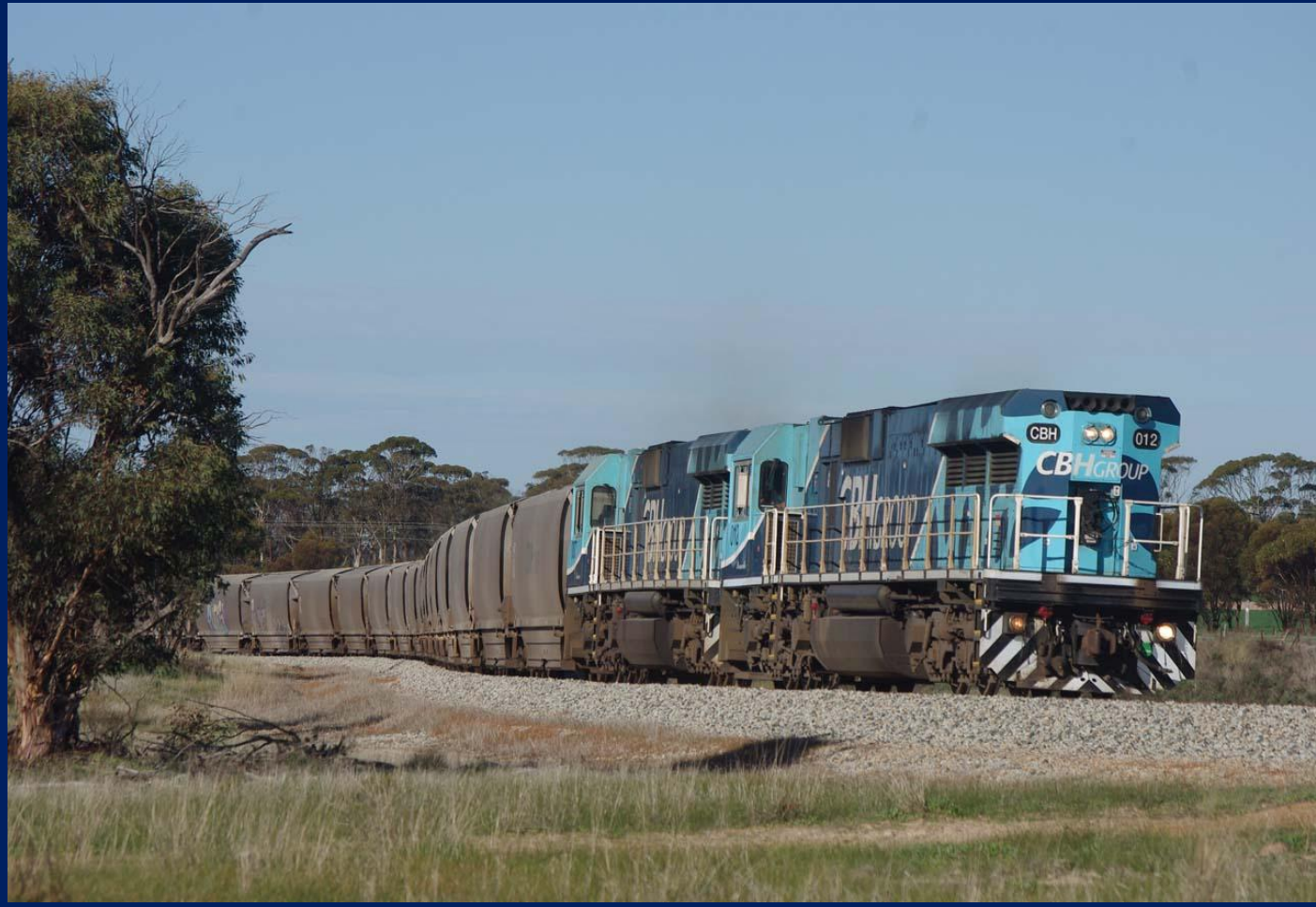
CBH012 & CBH007 on 6K42 Watco/CBH grain Cadoux July 18th.