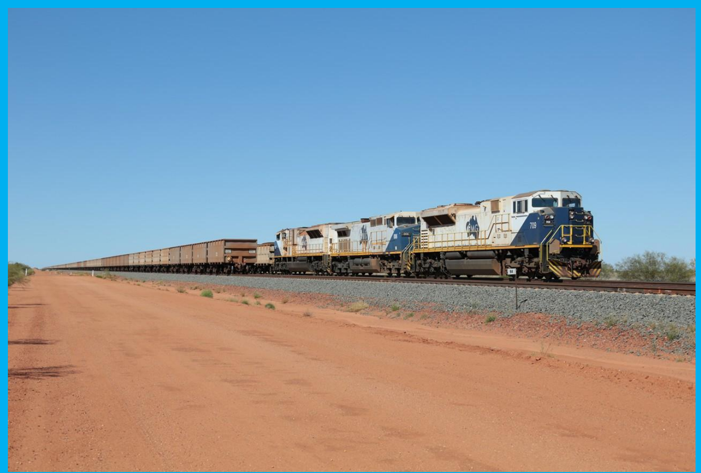
FMG 706, 009 & 907 loaded on west main passing empty on east main duplicated section Durak 95km 6/8.