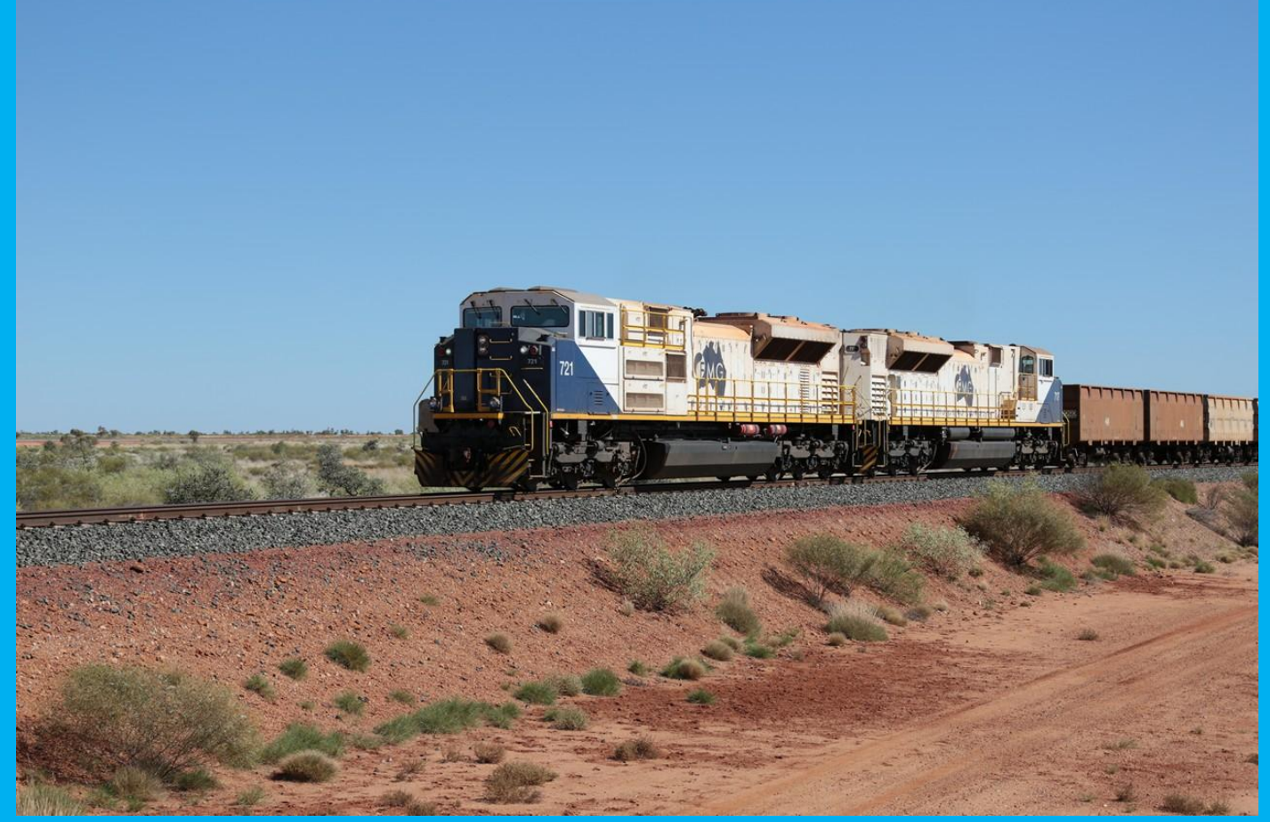
FMG 721 & 717 on empty ore at 87.5km Wodgina Road crossing 6/8.