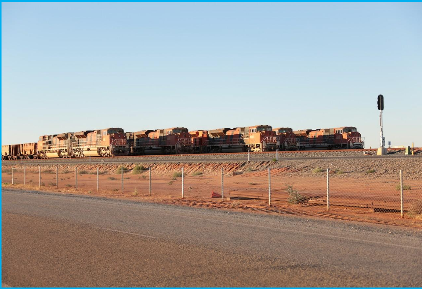
Five empty BHPBIO trains at Mooka staging facility waiting to depart 8th August.