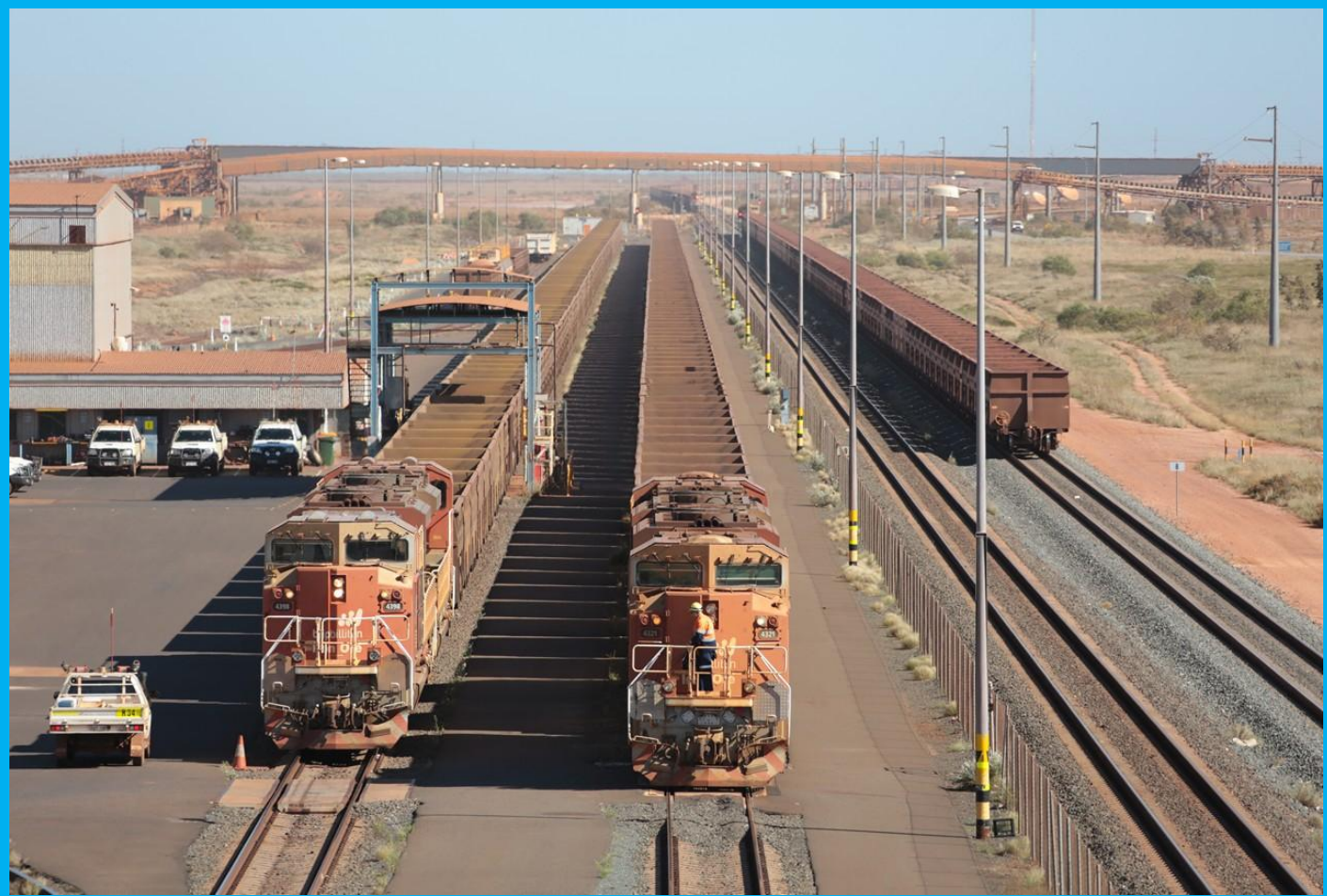
Boodarie ready tracks and main line and FMG conveyor belt at rear 14th August.