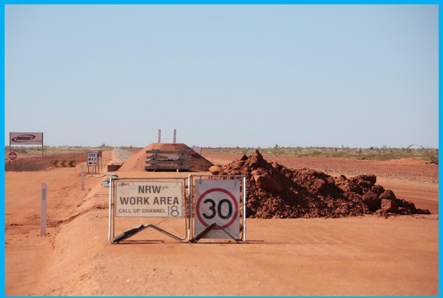
Northern end of the Roy Hill line at Port Hedland 14th August.