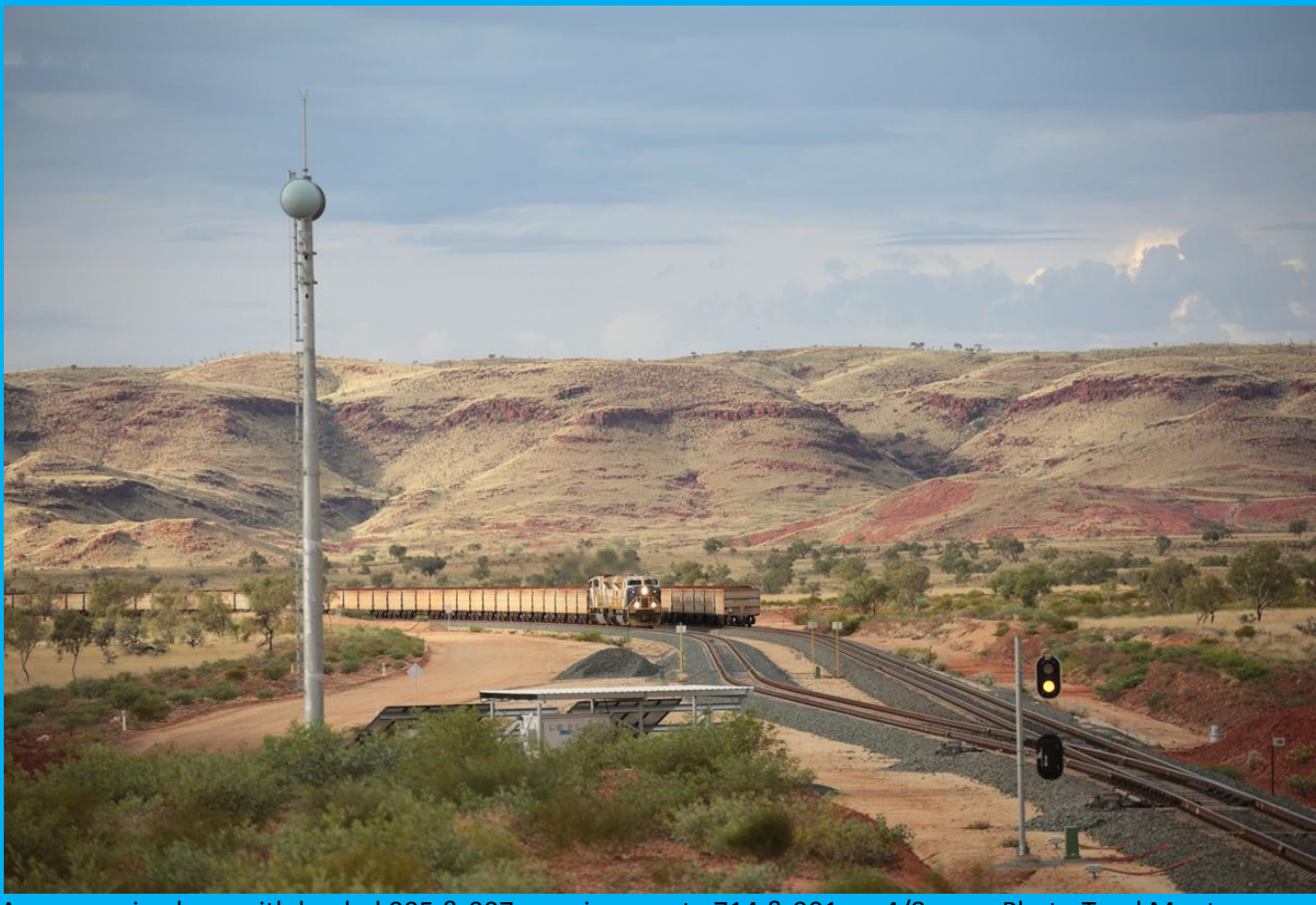
Avon crossing loop with loaded 905 & 007 crossing empty 714 & 901 on 4/8.