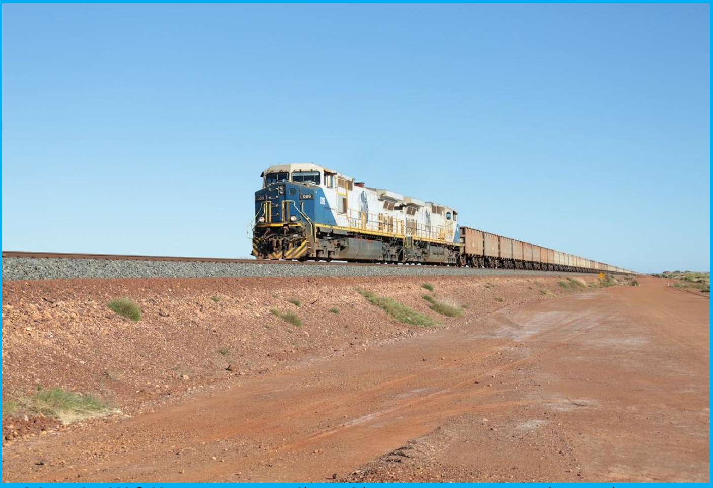
FMG CW44-9W 009 & 005 on empty ore at 50km on 6th August.