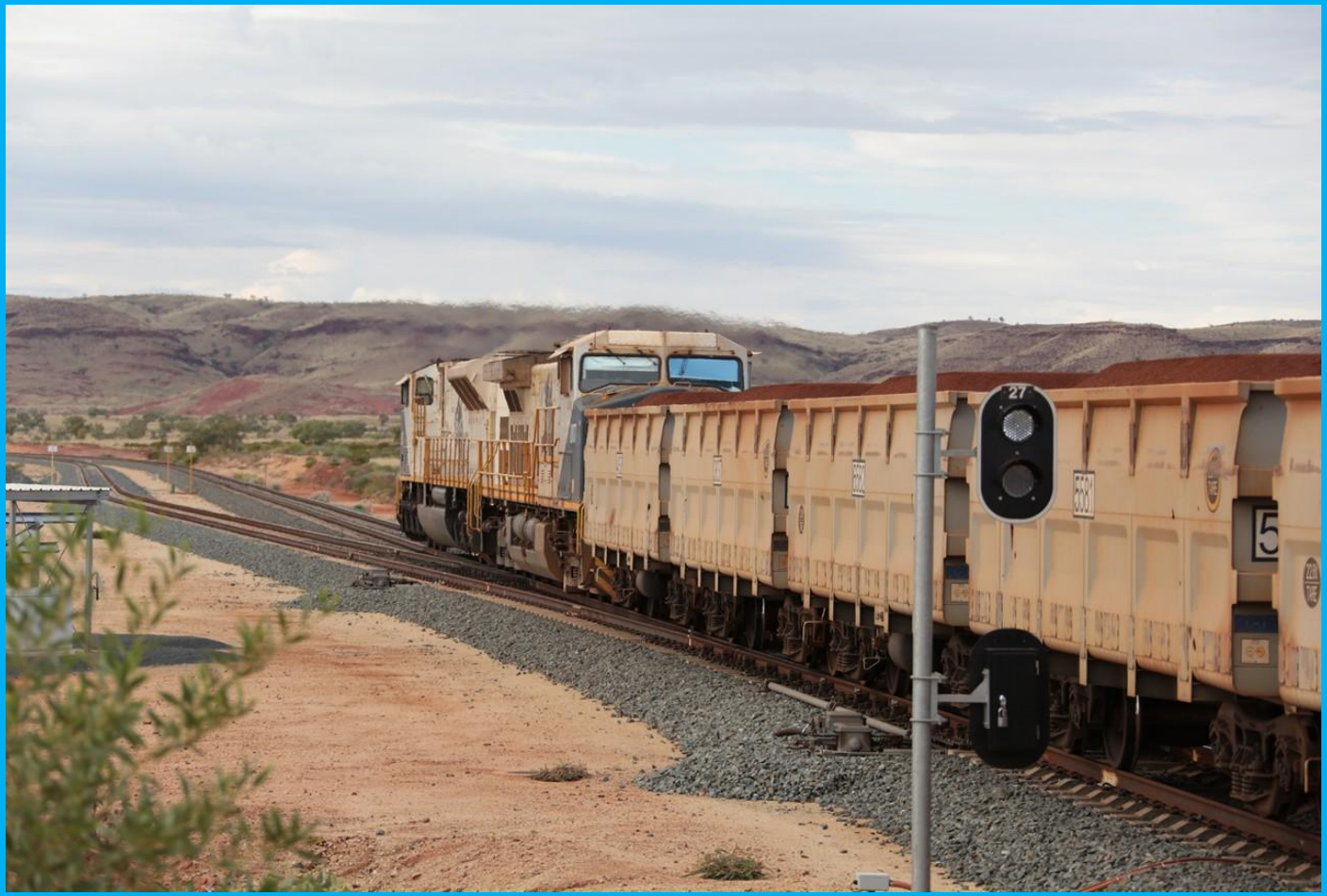
905 & 007 on main line as runs along Avon loop for cross 4th August.