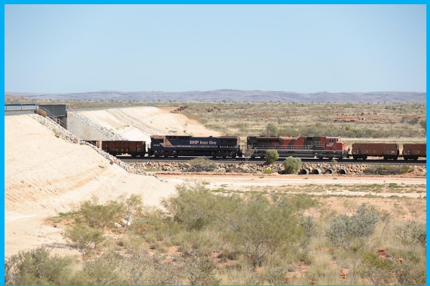
DPU units 4447 & 4669 on empty crossing under FMG Solomon line at Spring [FMG Nunna] 6/8.