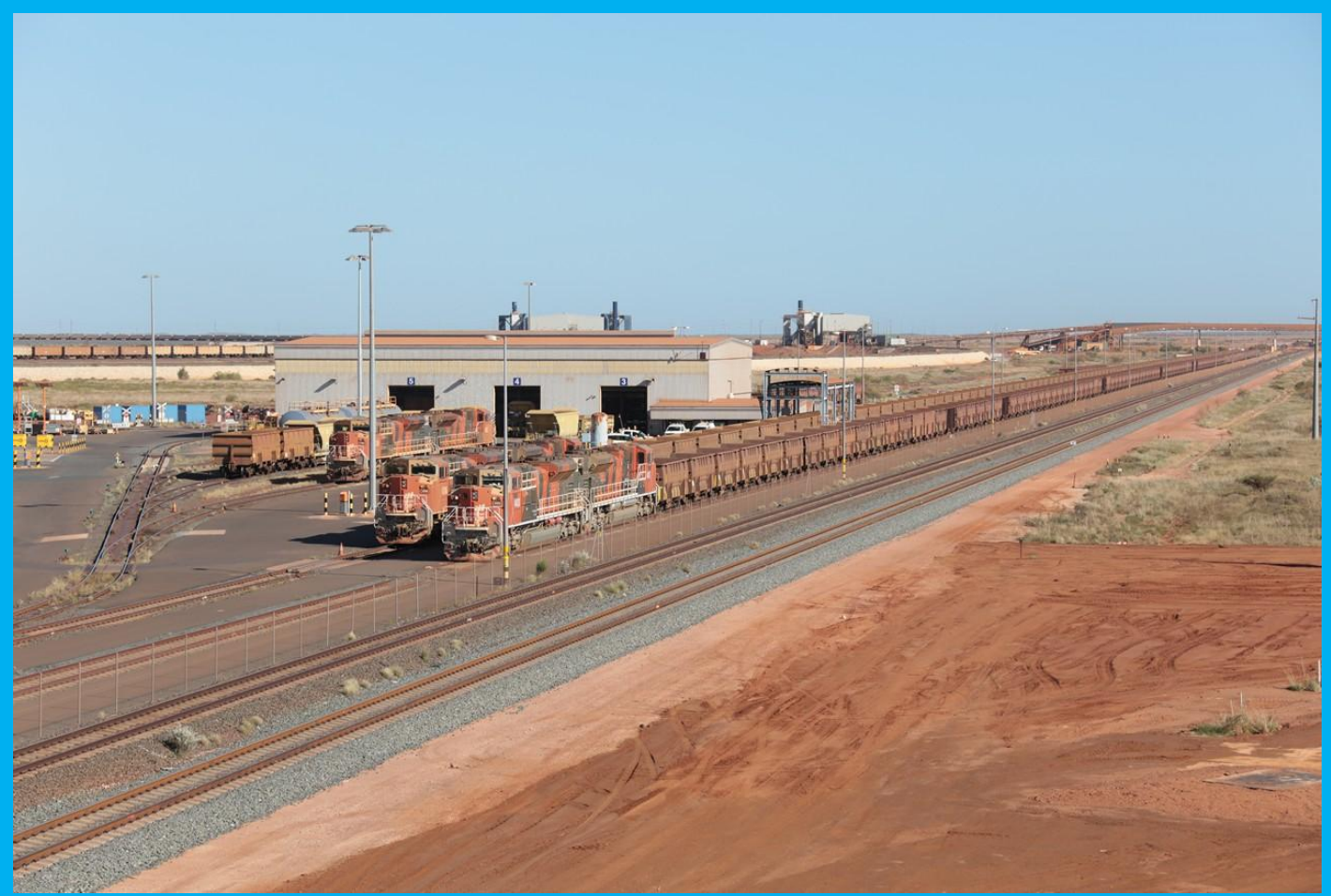
BHPBIO Boodarie service facility, staging roads, two track main to Finucane Island new line on old road 7/8.