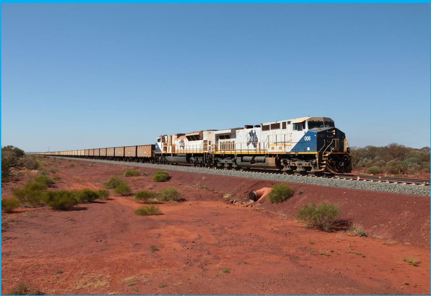
FMG 006 & 901 on empty ore at 255km Roebourne Wittenoom Road crossing 3rd August.