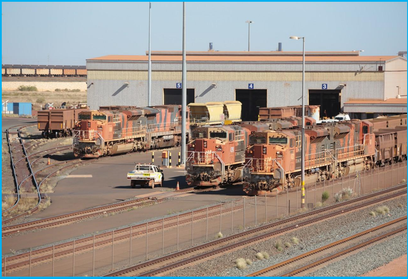
Boodarie maintenance and service facility 14th August.