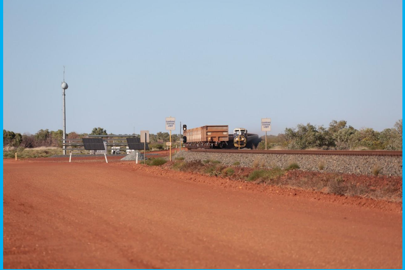
FMG 714 & 901 on loaded ore crossing empty ore in Canning loop 6th August.