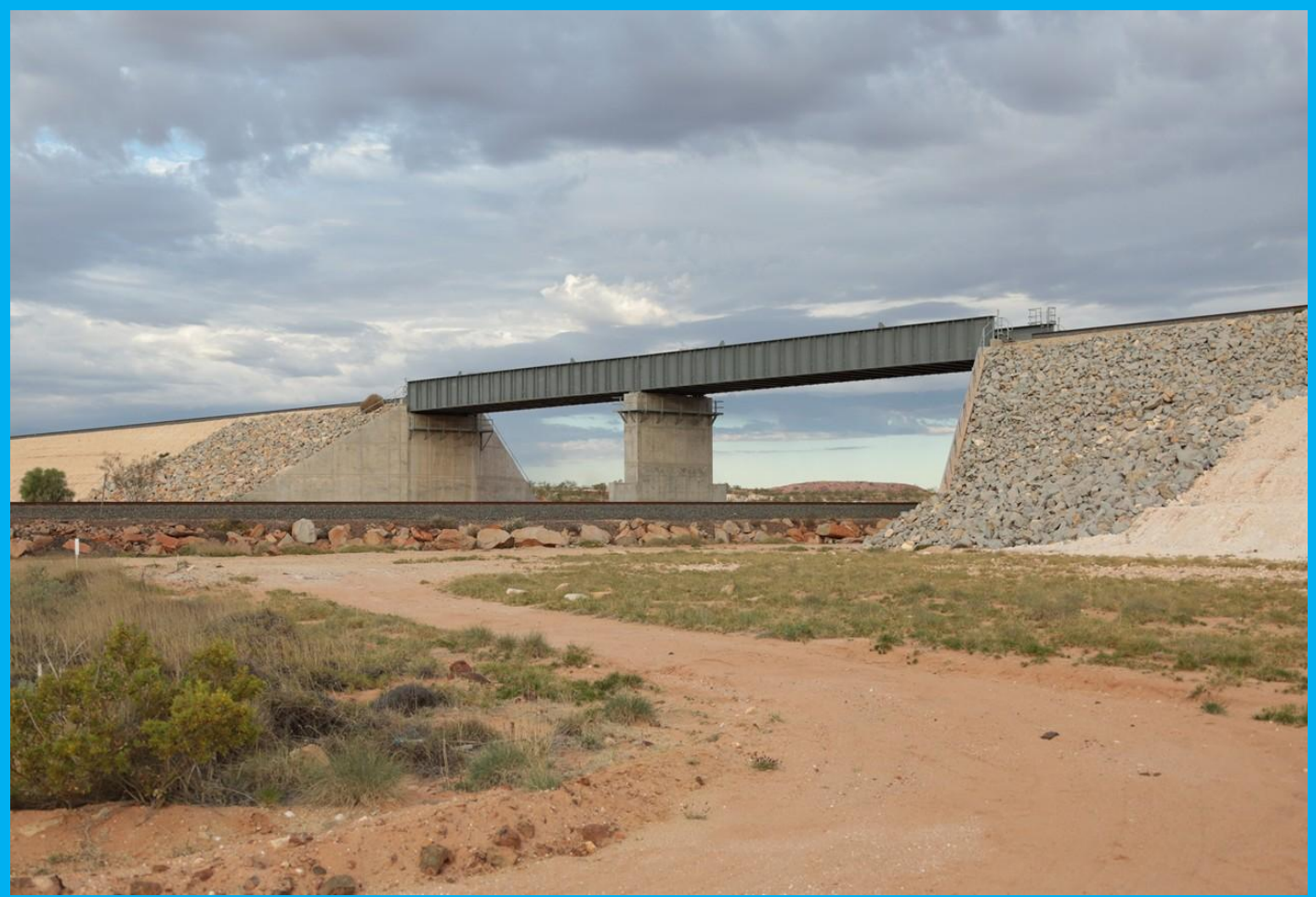
FMG Solomon line crossing BHPBIO Newman line at Nunna 179km on 4th August.