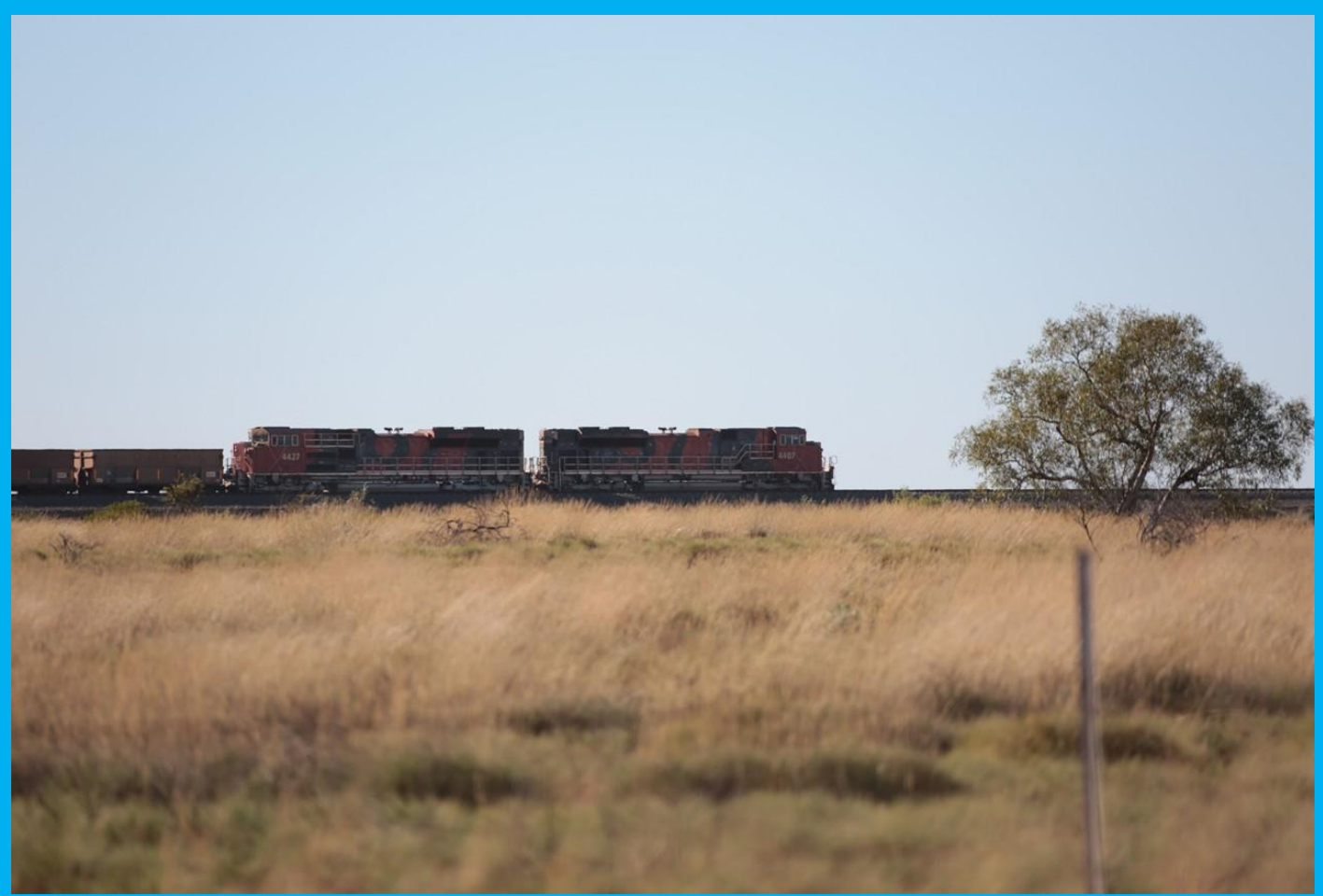
BHPBIO SD70ACe 4407 & 4427 on empty ore heading south taken from FMG Canning loop 6/8.