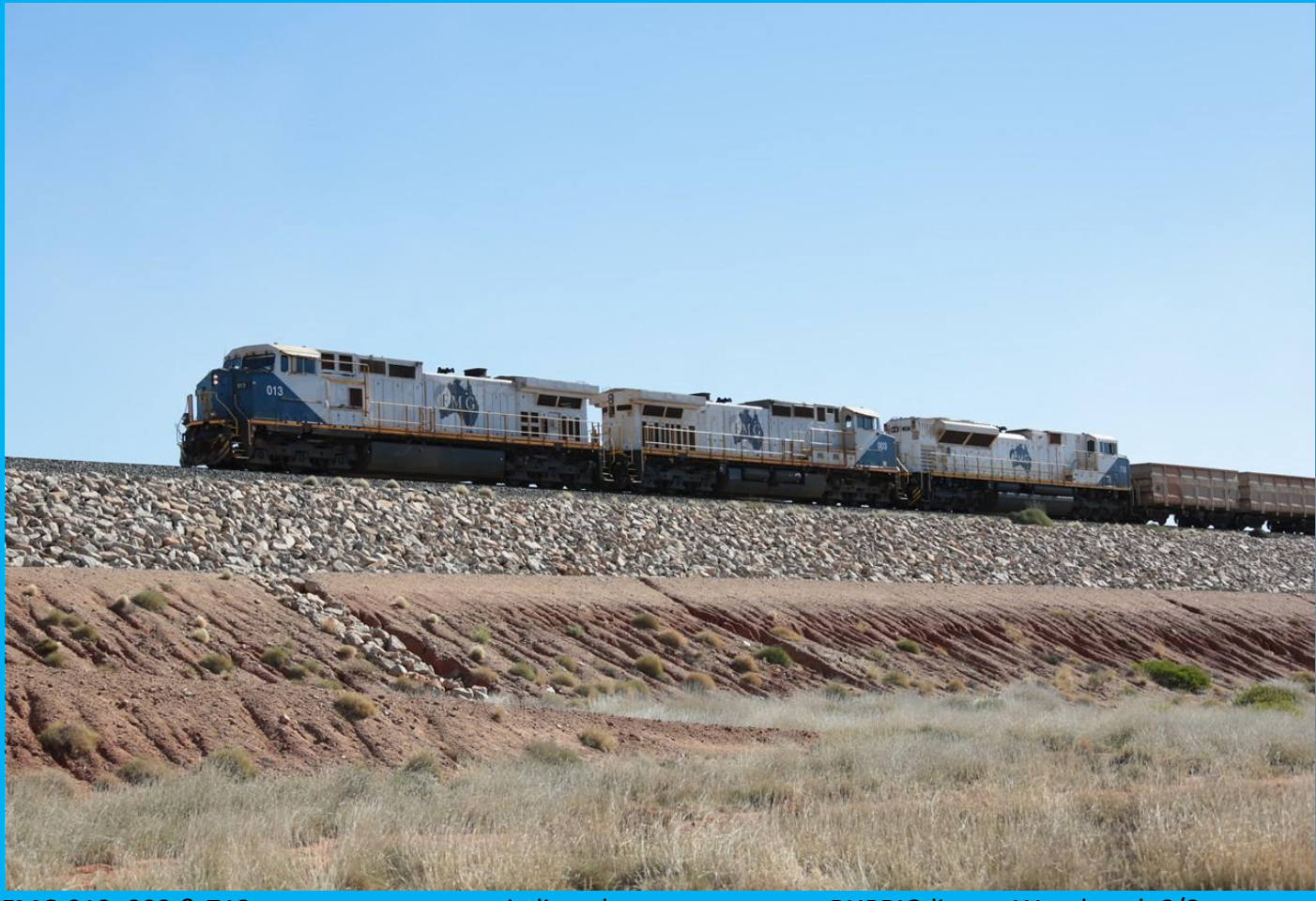
FMG 013, 003 & 712 on empty ore on main line about to cross over BHPBIO line at Woodstock 6/8.