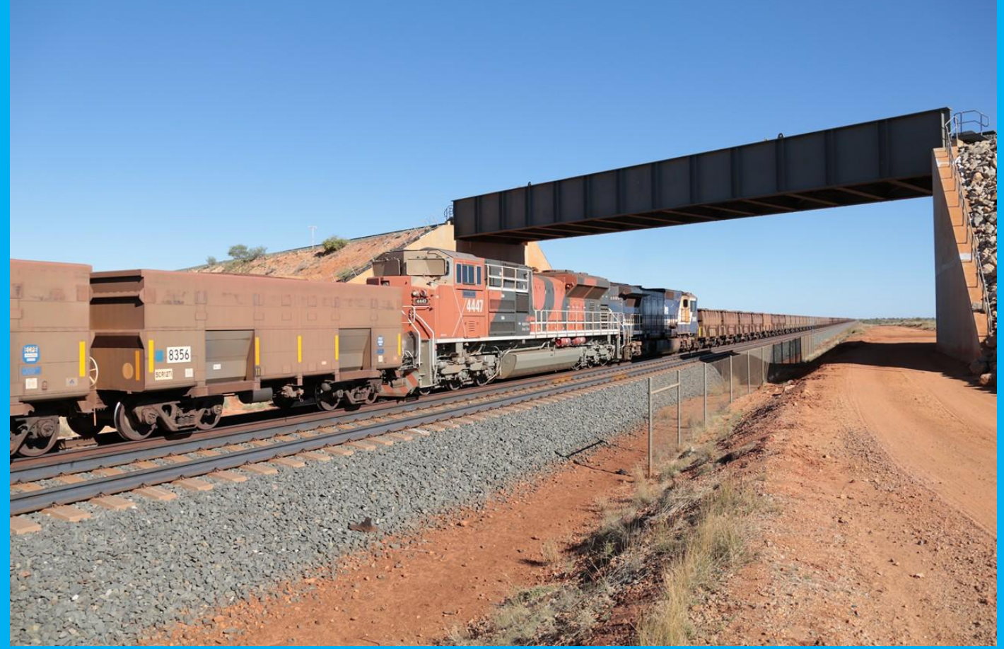
DPU units SD70ACe 4447 & CM40-8M 5669 going under FMG line 6th August.