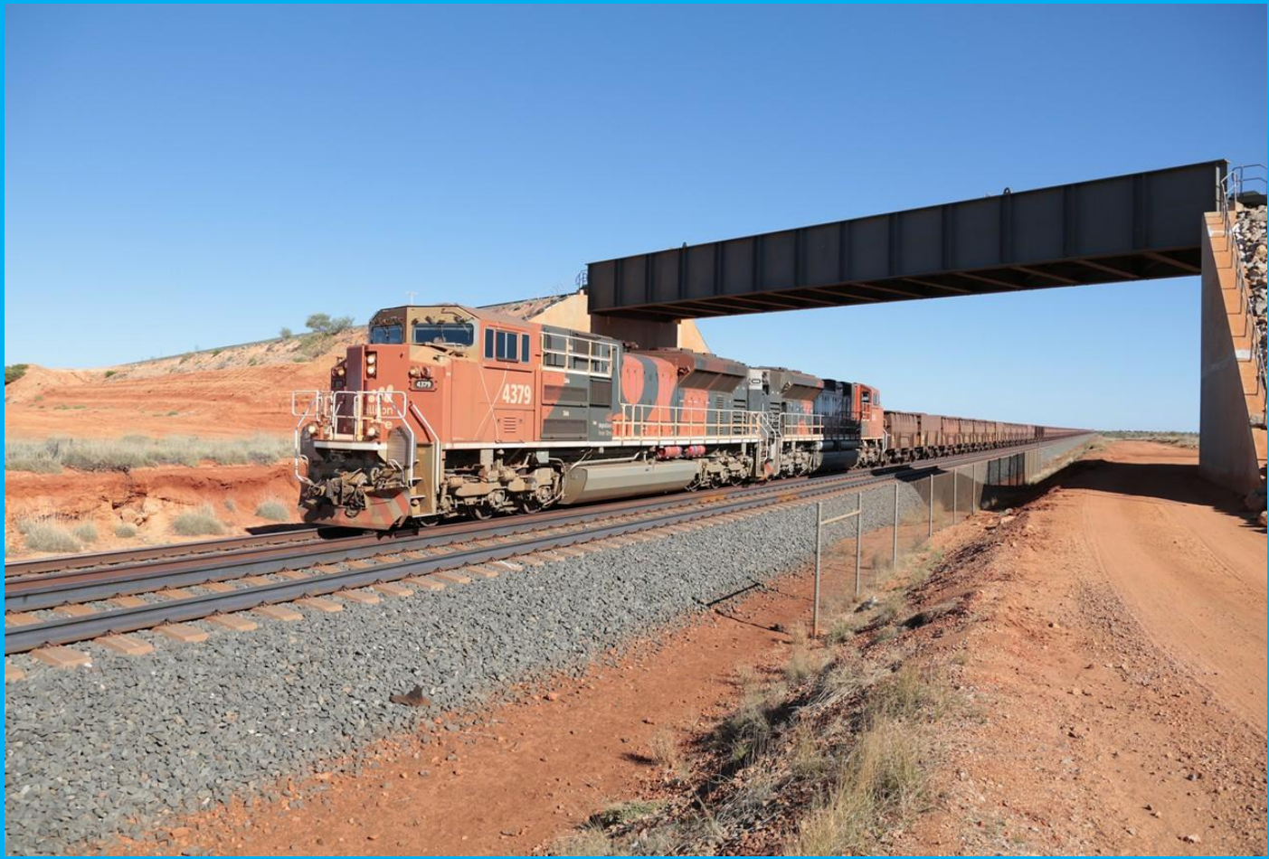
BHPBIO 4379 & 4414 on ore going under FMG crossover at Woodstock 6/8. Photo