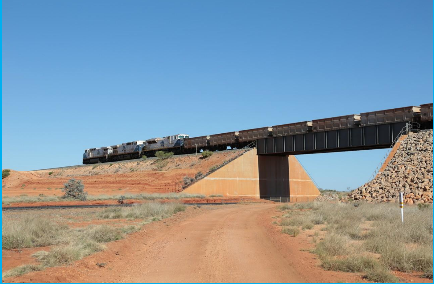
FMG 013, 003 & 712 on empty ore crossing BHPBIO line at Woodstock 6/8.