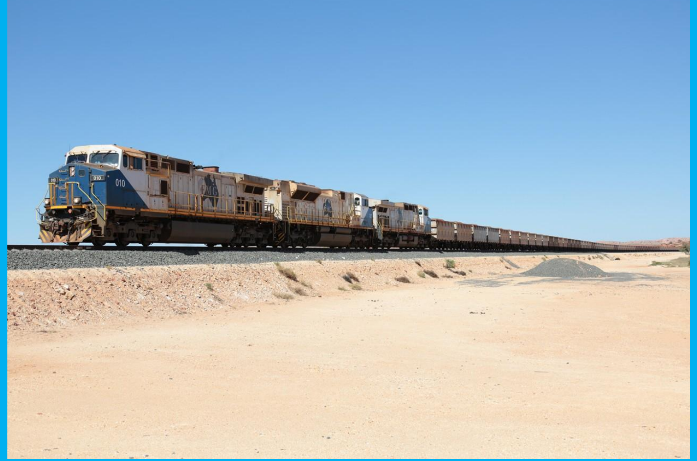
FMG 010, 707 & 008 off Solomon line about to join mainline at Nunna 6/8.