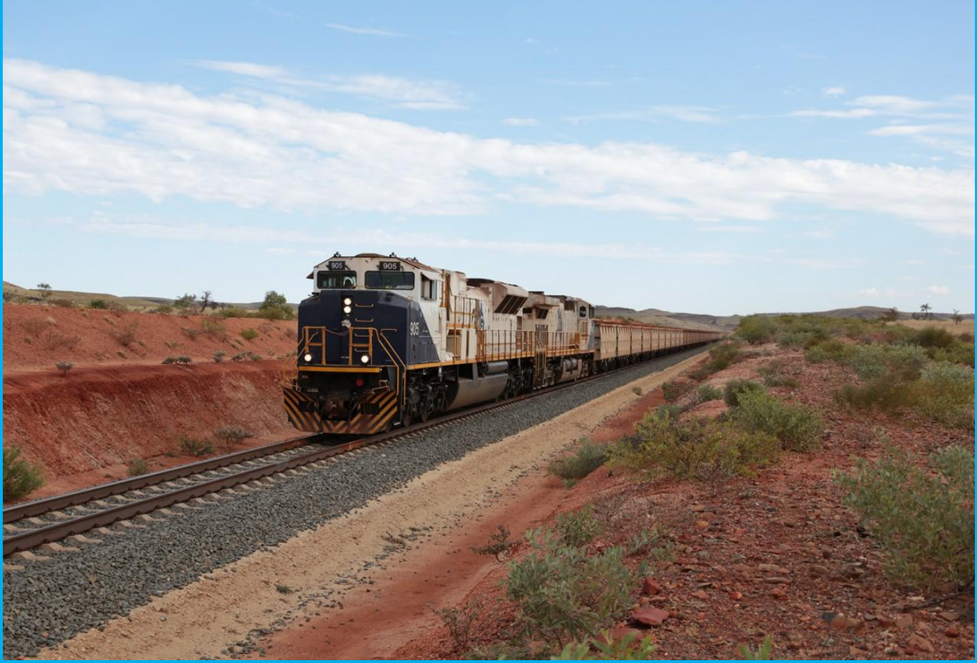
FMG 905 & 007 approaching Avon loop for crossing 4th August.