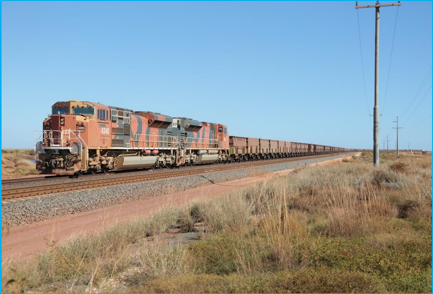
BHPBIO 4340 & 4354 on empty ore rake waiting to enter Boodarie Yard 14/08.