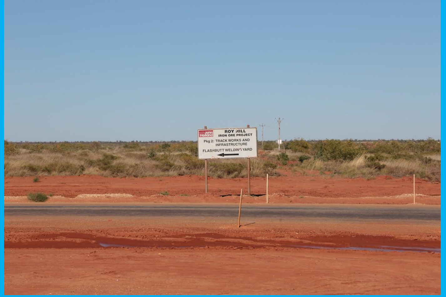
Roy Hill Iron Ore Project entry sign at Port Hedland 14th August.