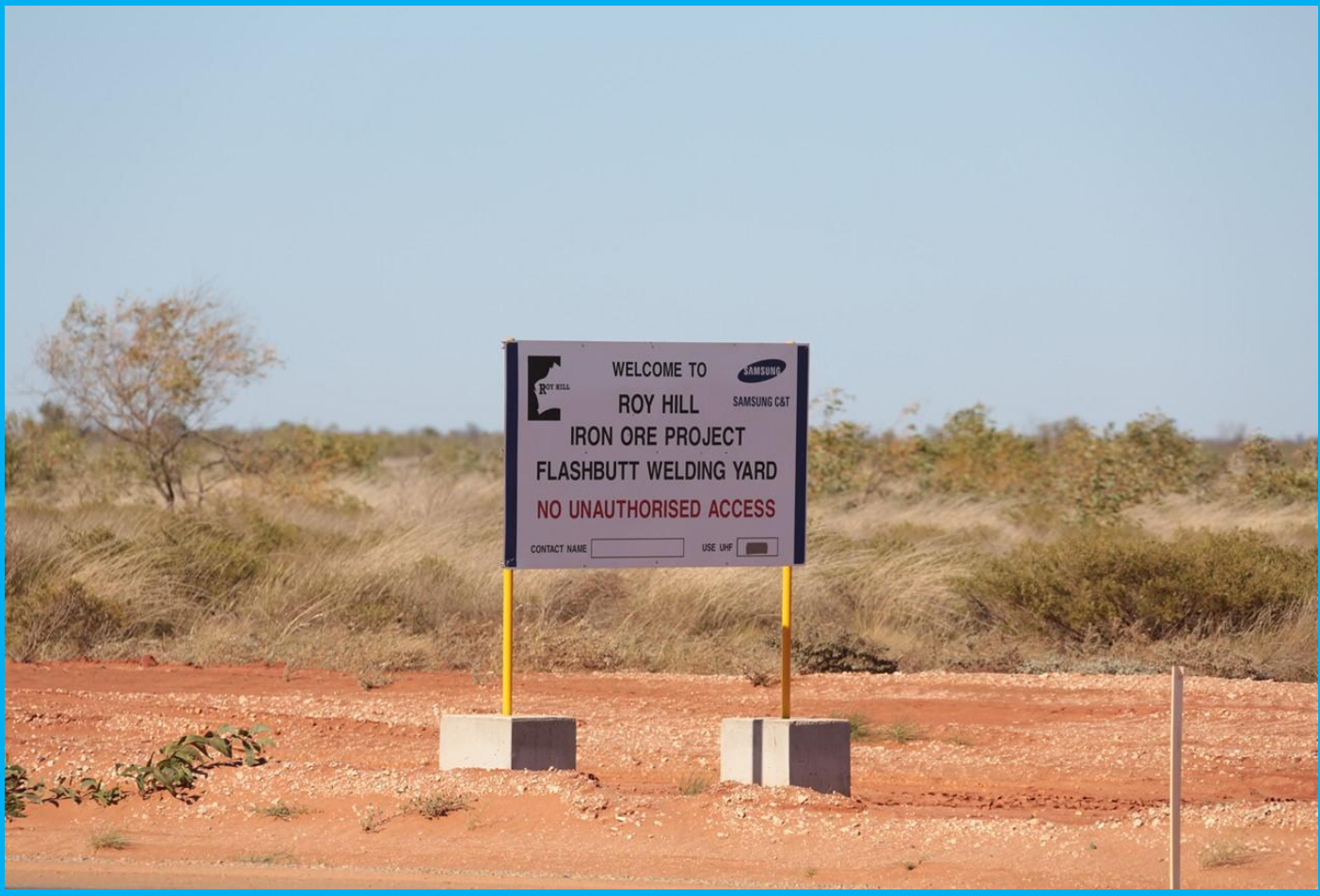
Sign at entry to Roy Hill flashbutt welding yard Port Hedland 14th August.