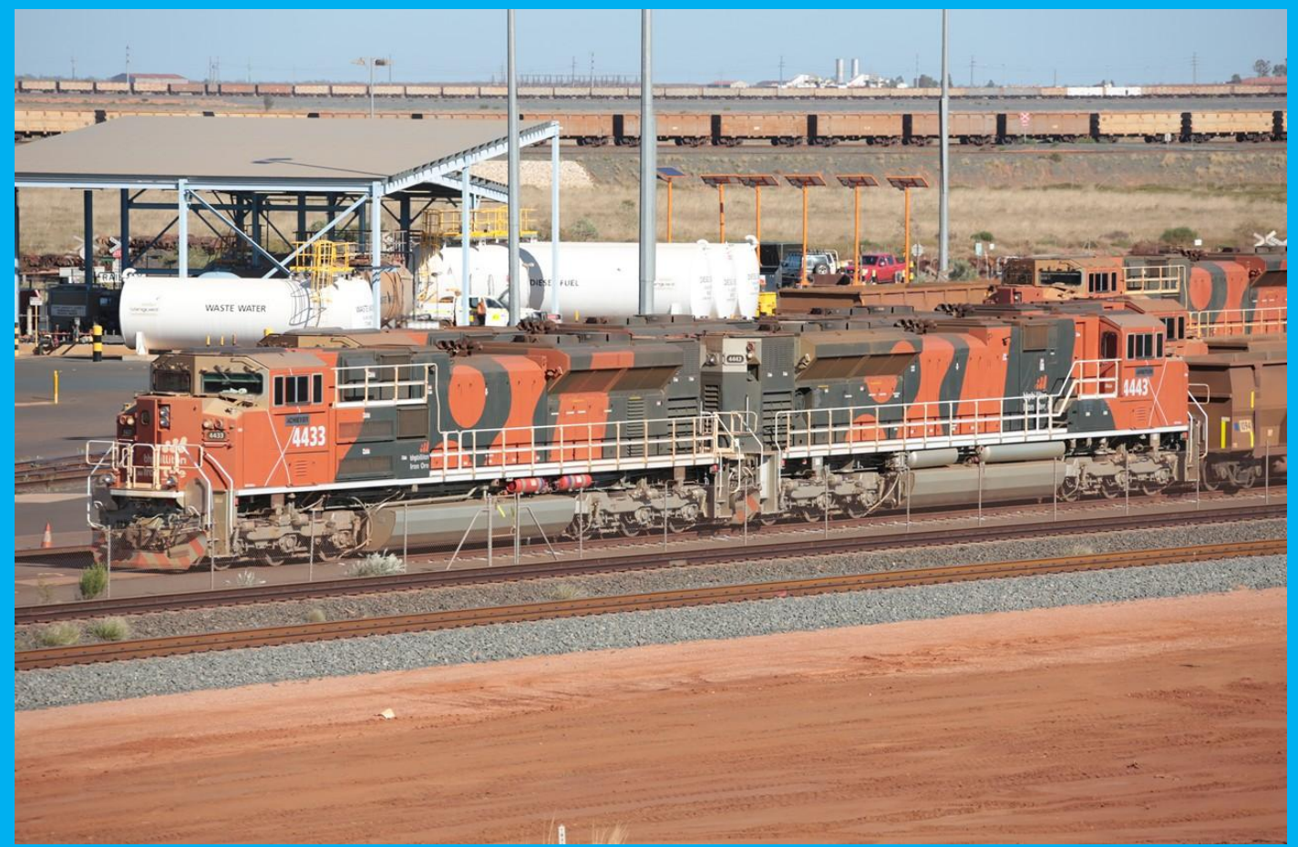
SD70ACe 4433 & 4443 on ready track Boodarie with FMG train their loop 7/8.