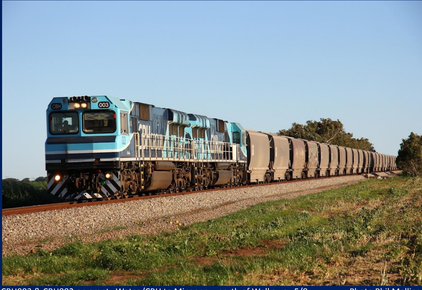
CBH003 & CBH002 on empty Watco/CBH to Mingenew north of Walkaway 5/8.