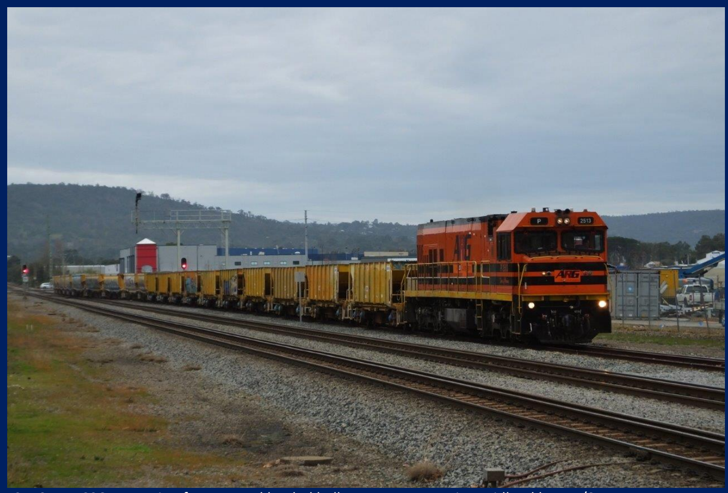
P2513 on 5C06 test train of empty and loaded ballast wagons entering Midland loop 7/8.