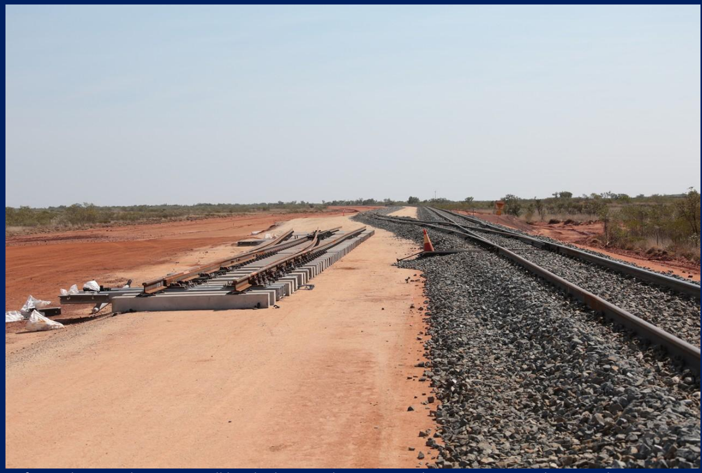
Refuge siding at 44km on Roy Hill line looking north August 22nd.