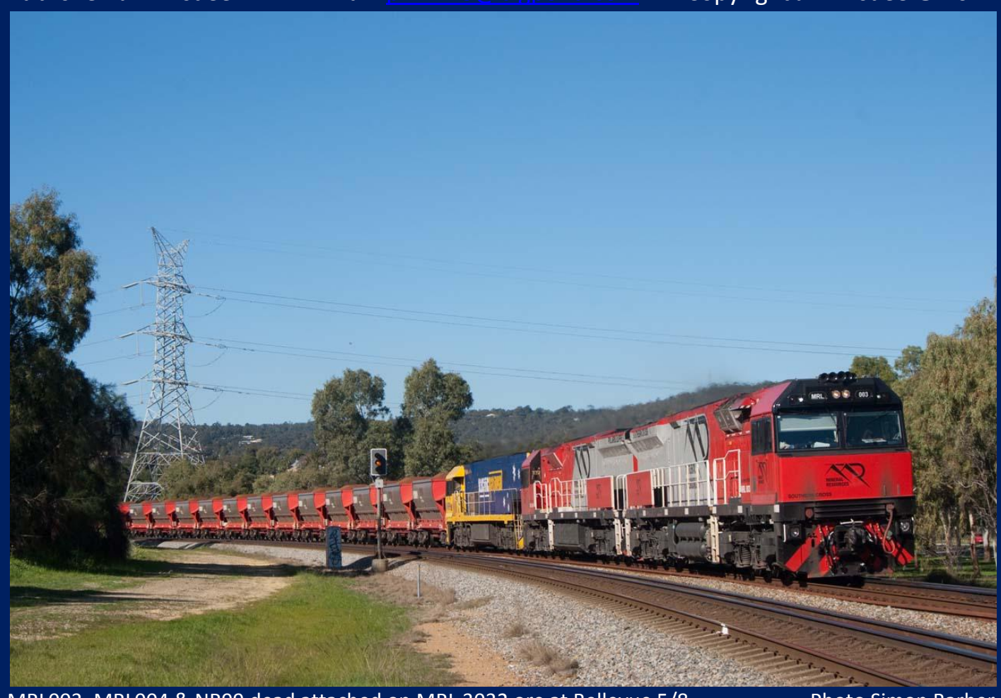
MRL003, MRL004 & NR99 dead attached on MRL 3032 ore at Bellevue 5/8.