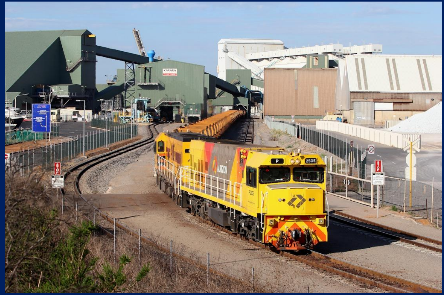
P2505 & P2510 unloading Mt Gibson Perenjori ore train at Geraldton Port 10/8.