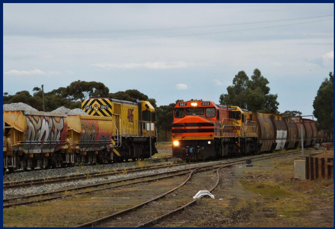
DBZ2312 & DBZ2307 on 1304 empty woodchip wagons cross DAZ1901 stabled on ballast Wagin 17/8.