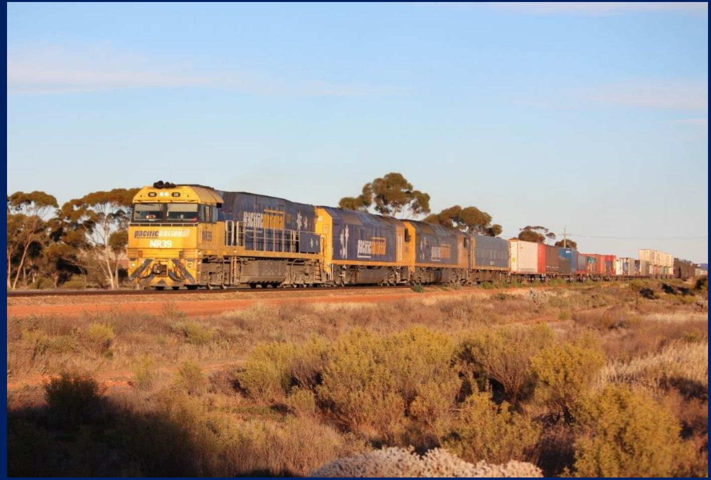
NR39, AN3 & AN8 on 3MP5 intermodal arriving at Parkeston August 14th.