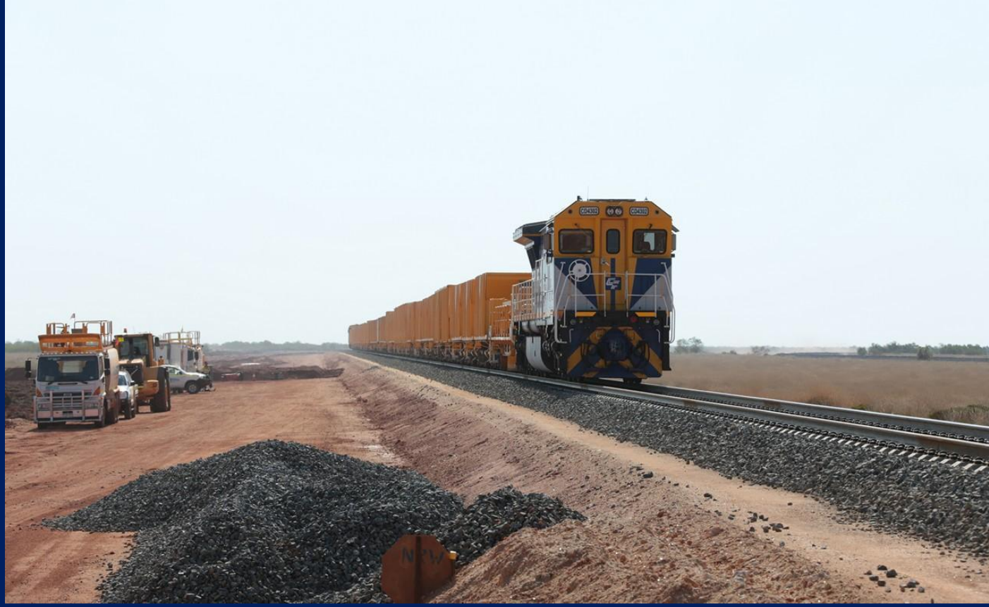
CD4302/CD4305 on empty ballast train at Indee Road crossing August 22nd.