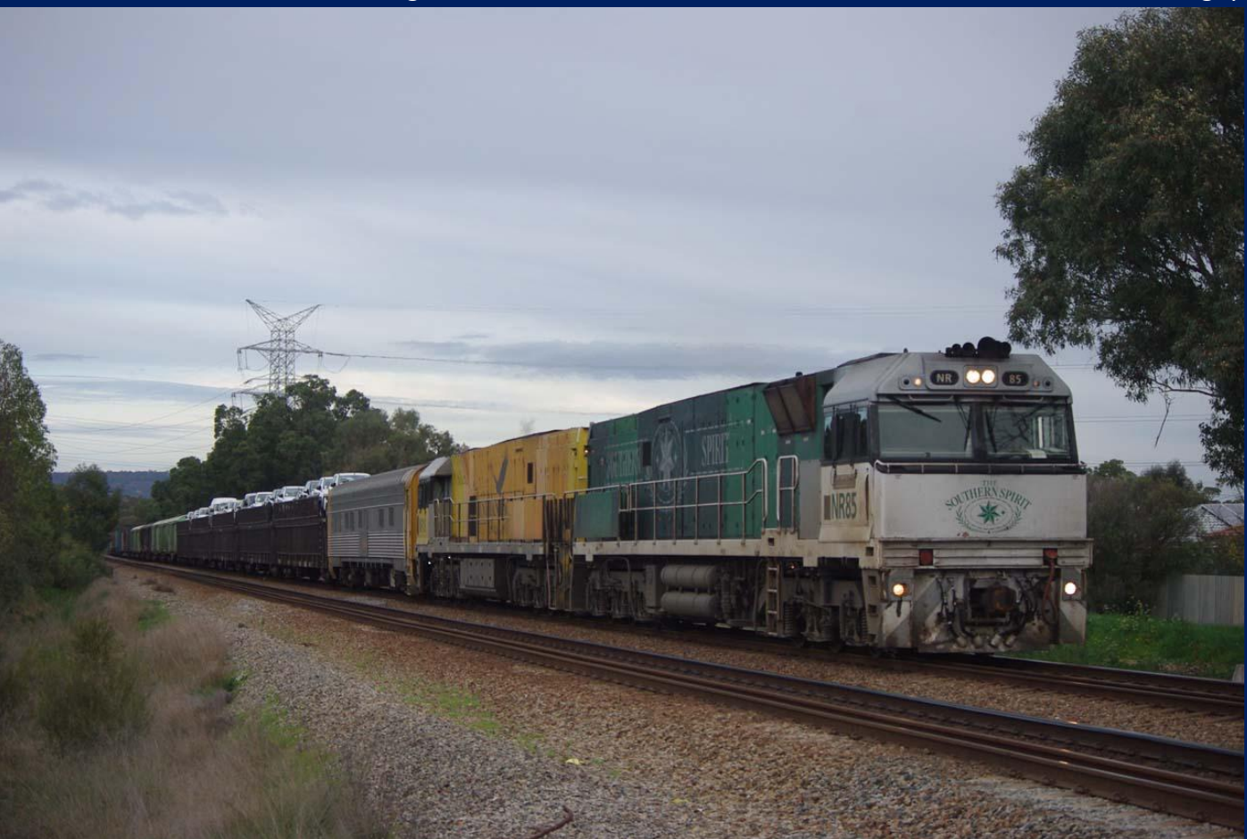
NR85 & NR18 on 7PM5 intermodal at Swan View on July 19th.