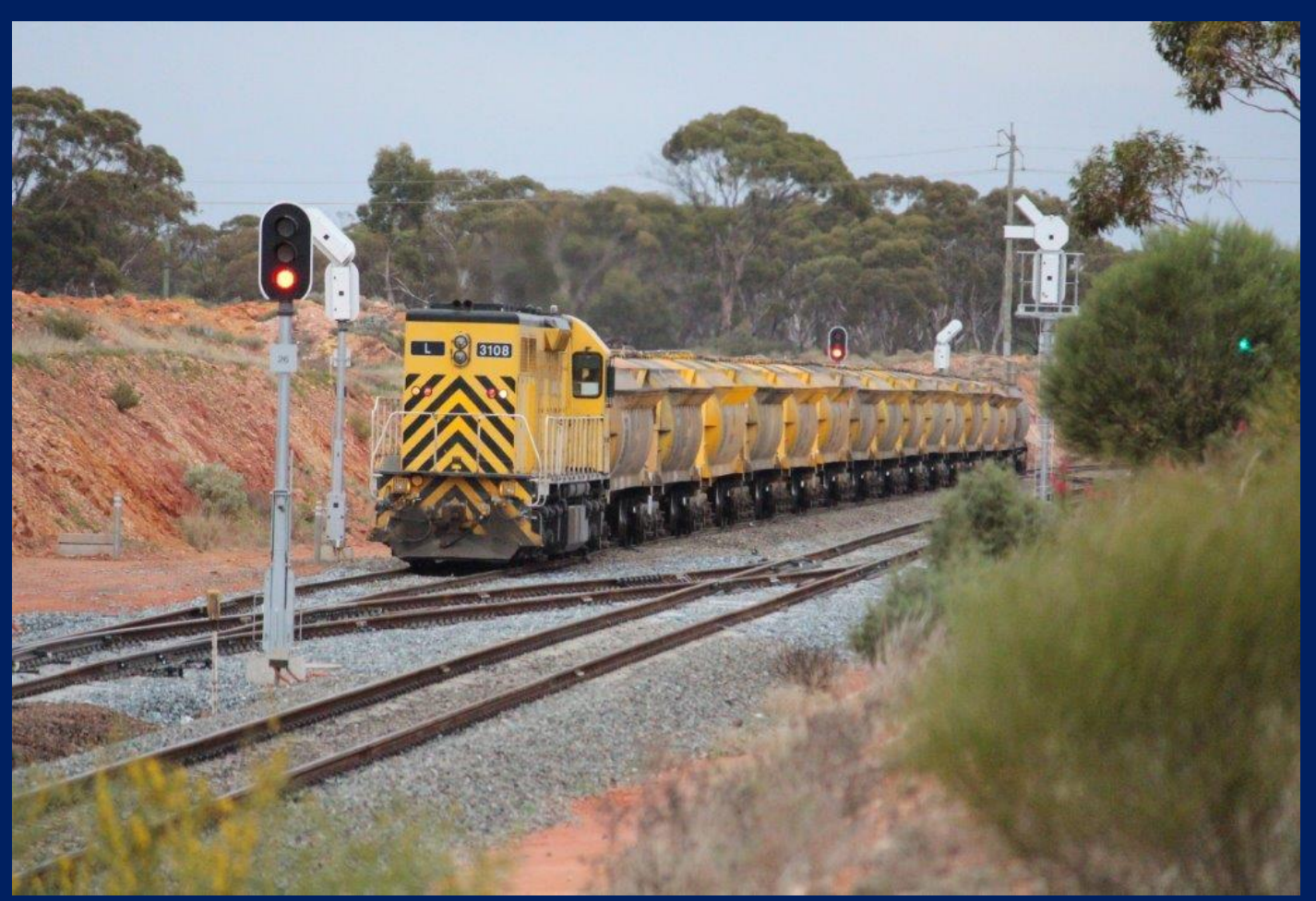
L3108 on 2438 empty nickel arriving from Hampton about to cross new crossovers August 11th.