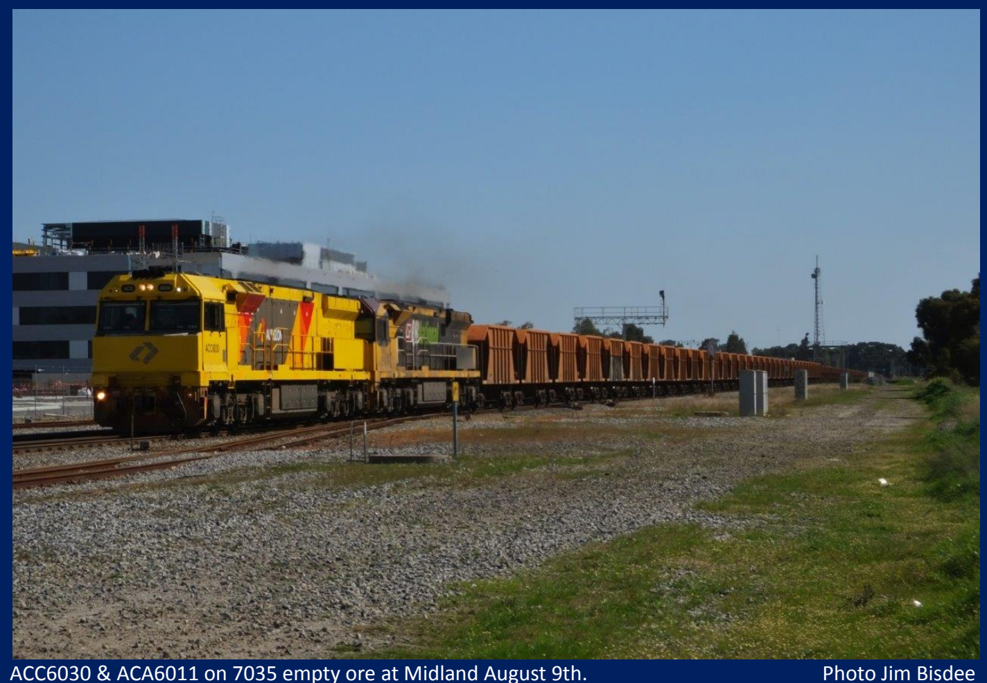
ACC6030 & ACA6011 on 7035 empty ore at Midland August 9th.