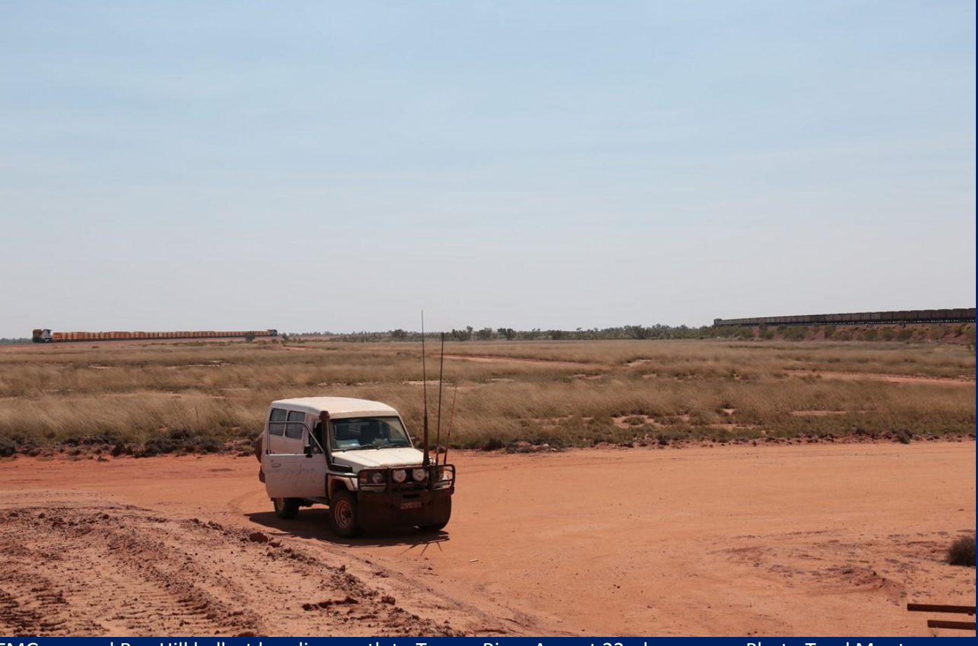
FMG ore and Roy Hill ballast heading north to Turner River August 22nd.