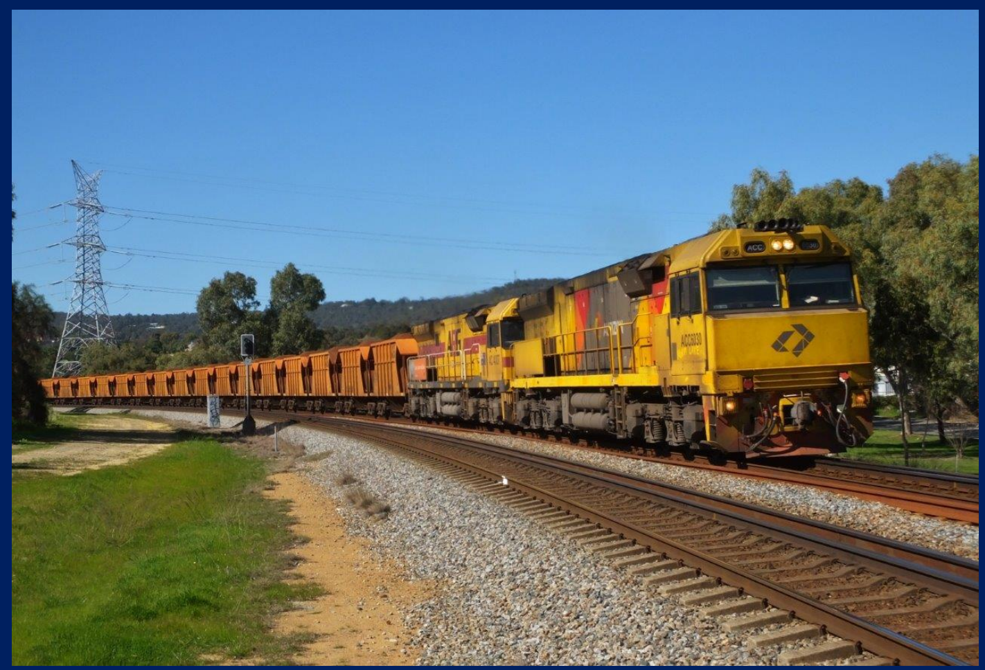
ACC6030 & AC4307 on 1030 ore at Bellevue August 3rd.