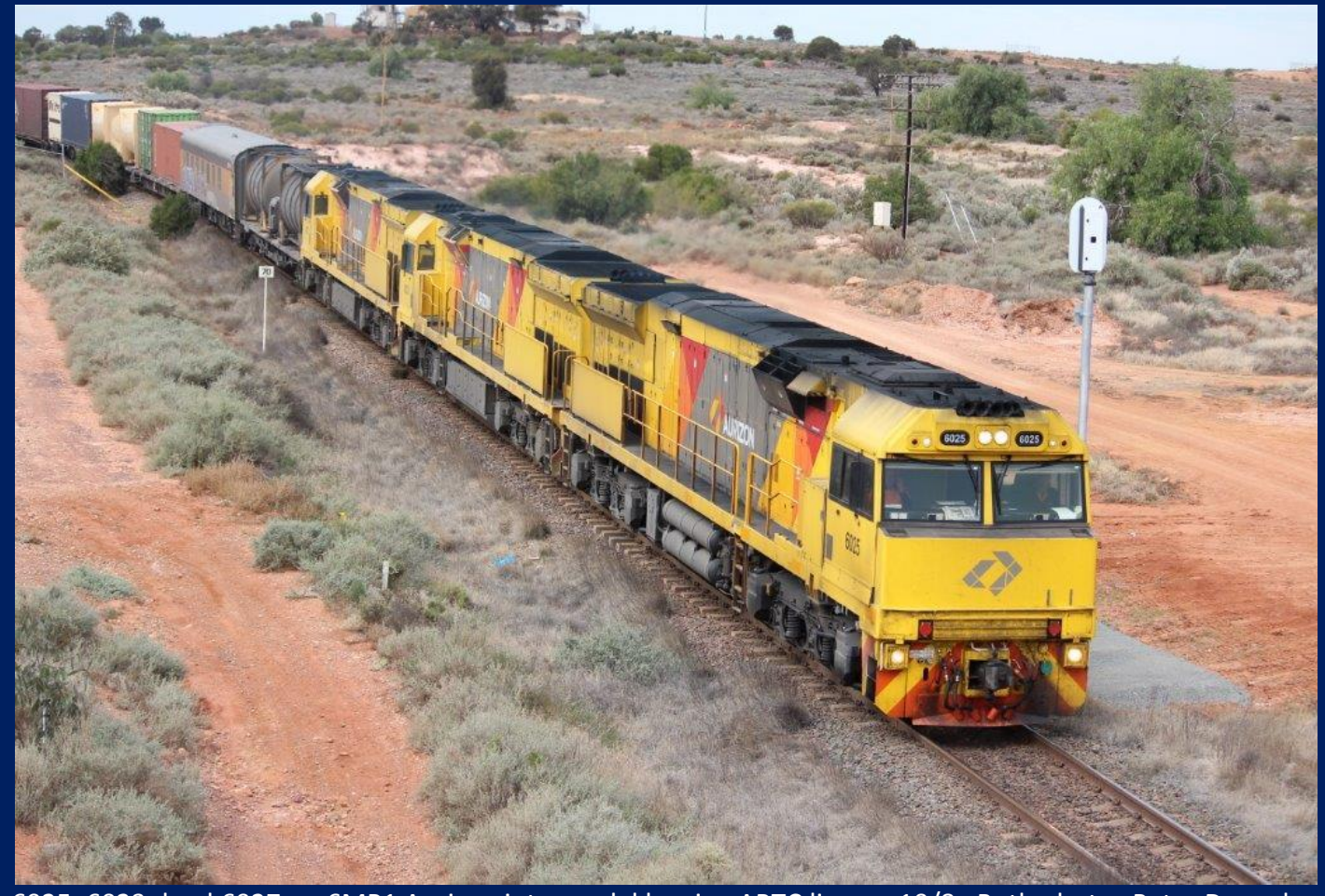
6025, 6023 dead 6027 on 6MP1 Aurizon intermodal leaving ARTC line on 10/8.