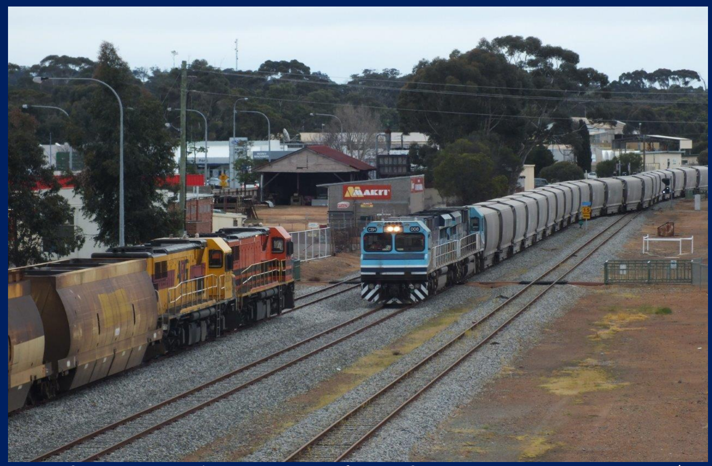
DBZ2312 & DBZ2307 on 2304 have very rare cross of CBH008 & CBH003 on 1K09 empty at Narrogin 17/08.