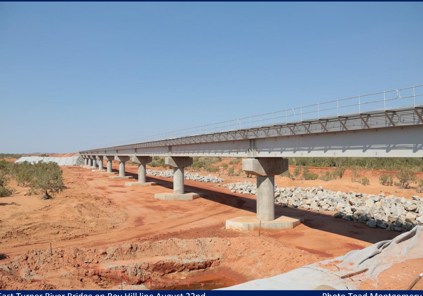
East Turner River Bridge on Roy Hill line August 22nd.