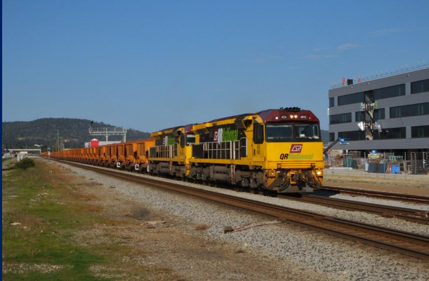
ACA6012 & ACA6010 on 7030 ore at Midland August 9th.