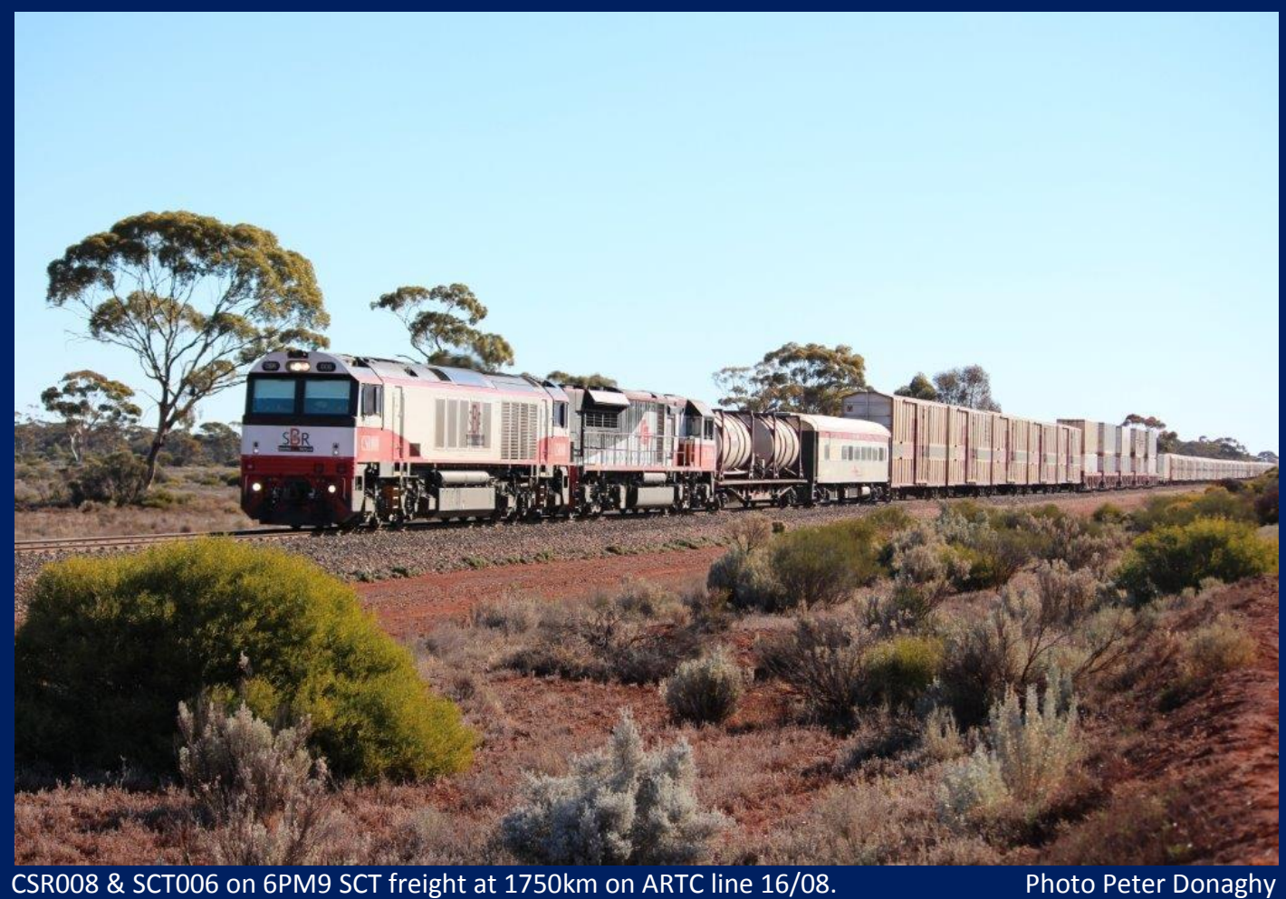
CSR008 & SCT006 on 6PM9 SCT freight at 1750km on ARTC line 16/08.