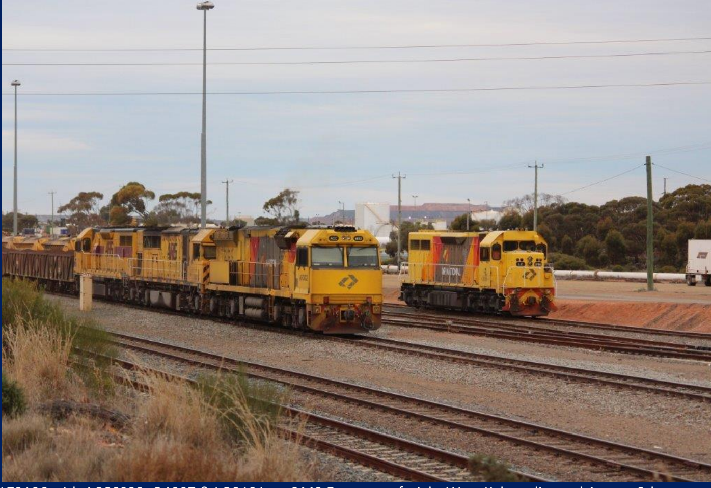
LZ3106 with ACC6032, Q4007 & LQ3121 on 6443 Esperance freight West Kalgoorlie yard August 8th.