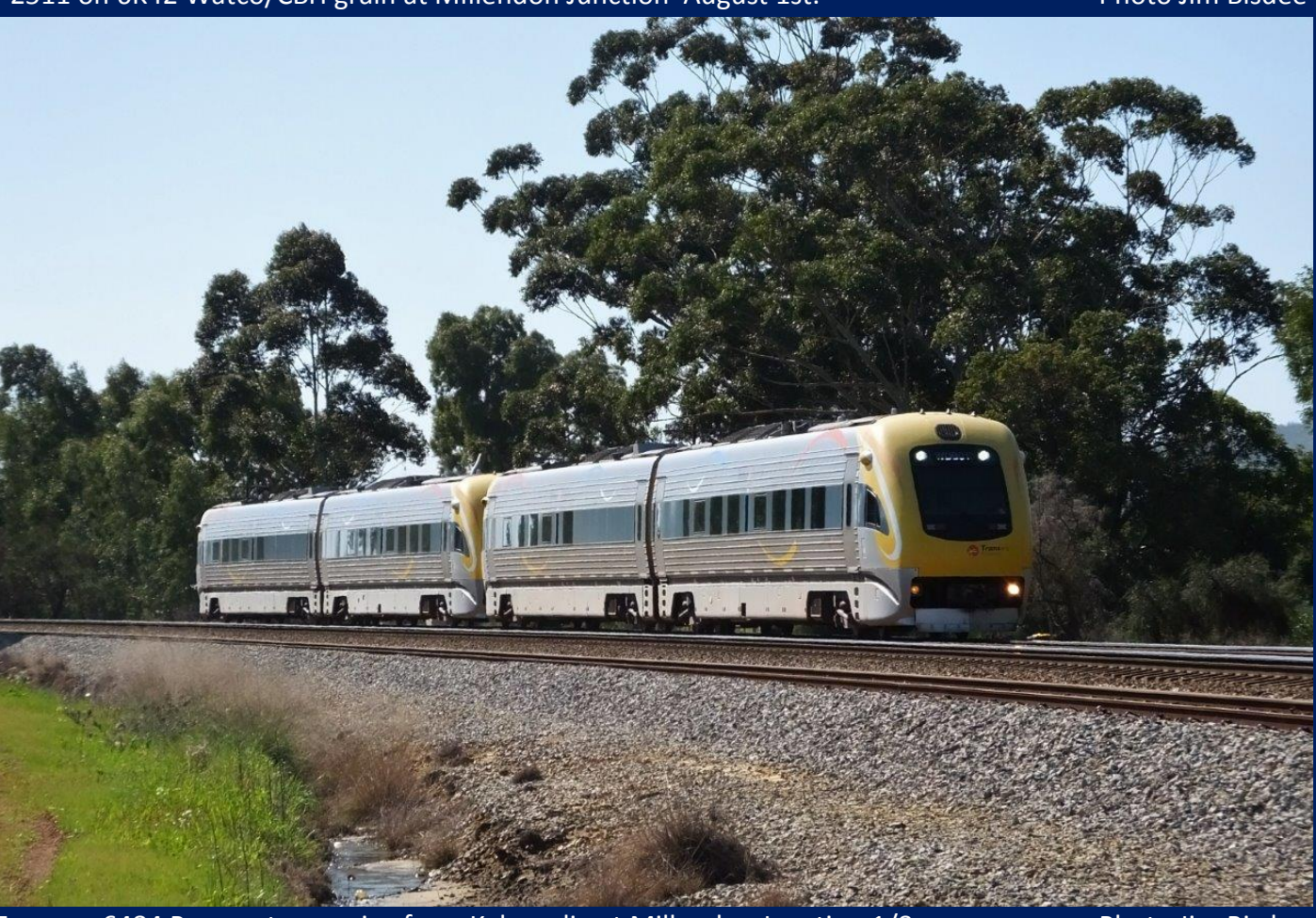
Four car 6484 Prospector service from Kalgoorlie at Millendon Junction 1/8.