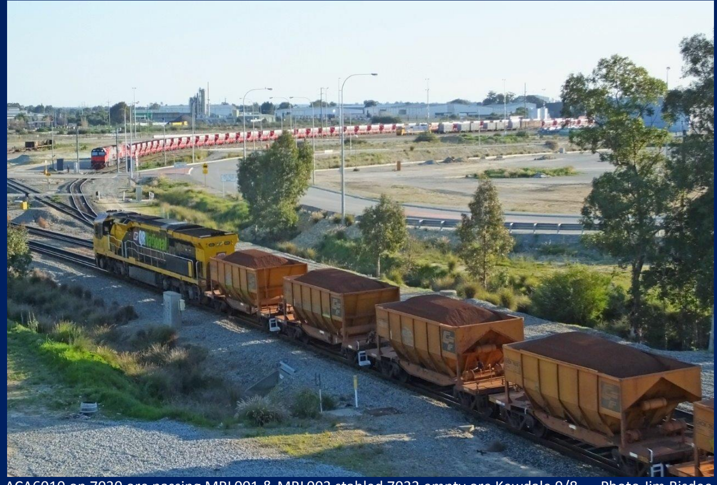
ACA6010 on 7030 ore passing MRL001 & MRL003 stabled 7033 empty ore Kewdale 9/8.