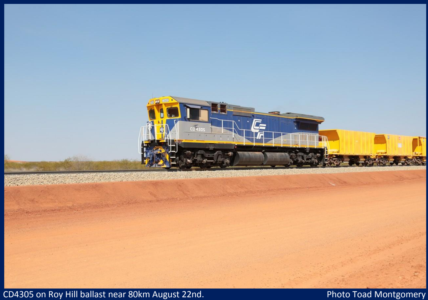
CD4305 on Roy Hill ballast near 80km August 22nd.