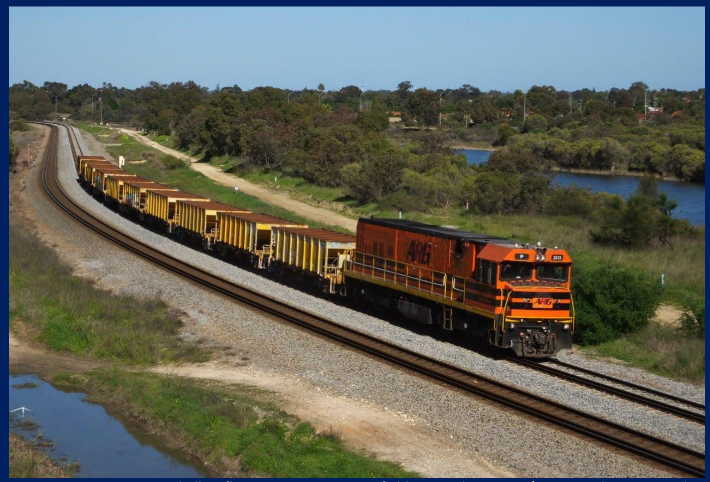
P2513 on 1111 empty XM ballast fleet Kwinana to Forrestfield at Wattle Grove 3/8.