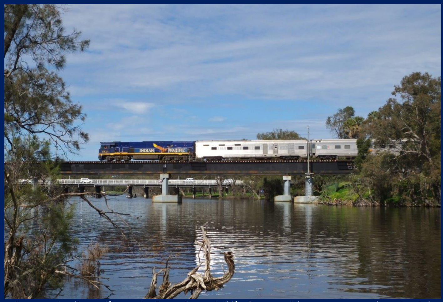
NR27 on 1PA8 Indian Pacific crossing Swan River at Guildford August 10th.