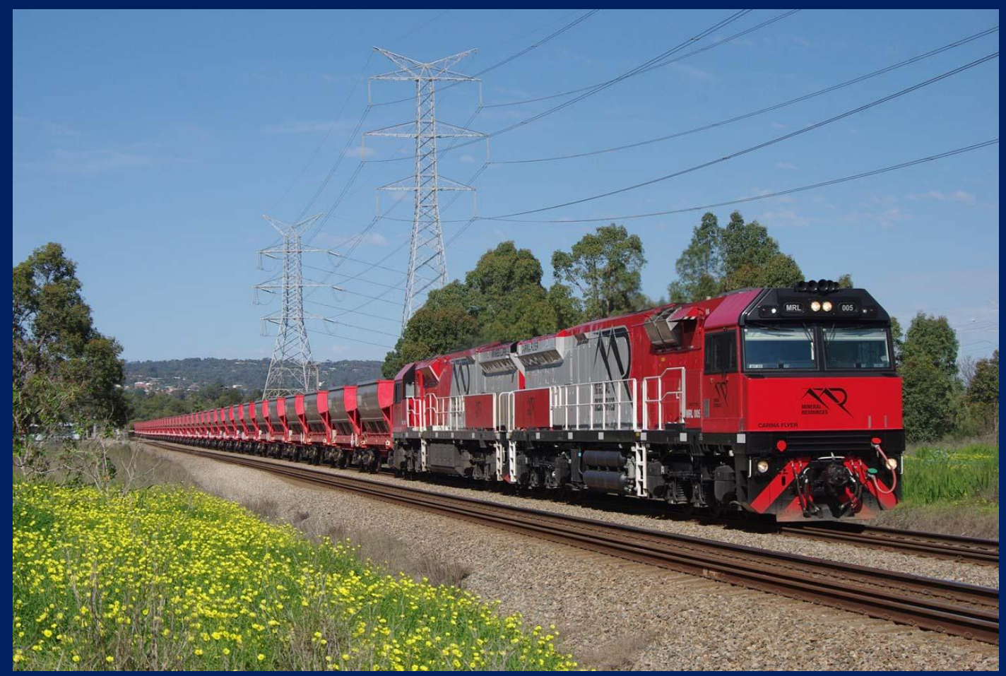
MRL005 & MRL001 on 2033 empty MRL ore at Middle Swan August 11th.