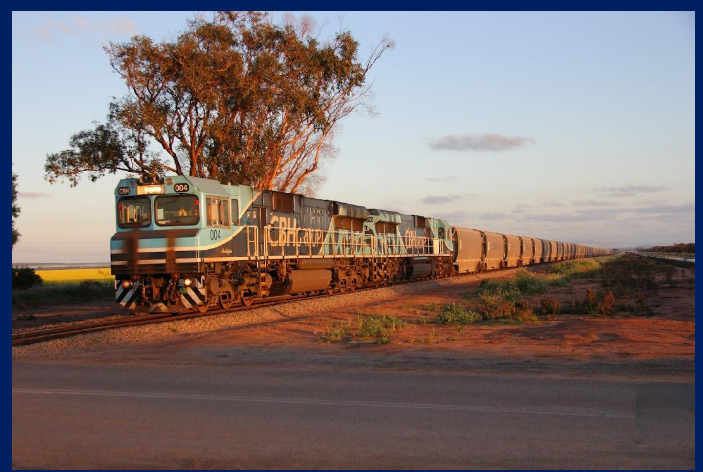
CBH004 & CBH010 on empty Watco/CBH grain to Mingenew at Georgina August 2nd.