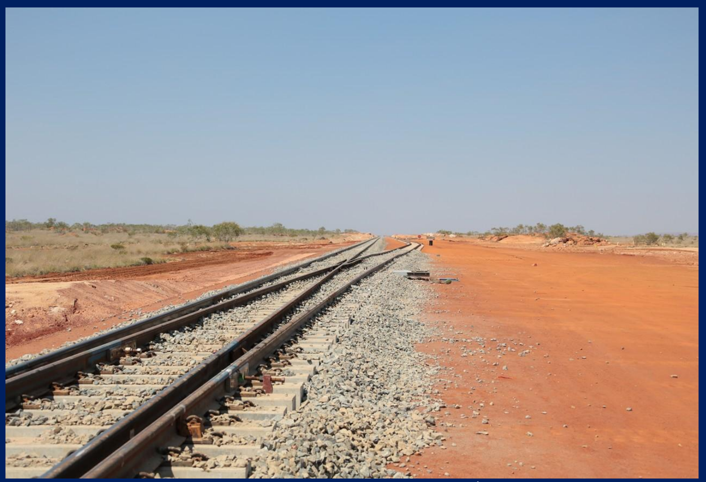
North end of new crossing loop on Roy Hill line at 76km looking south 22/8.