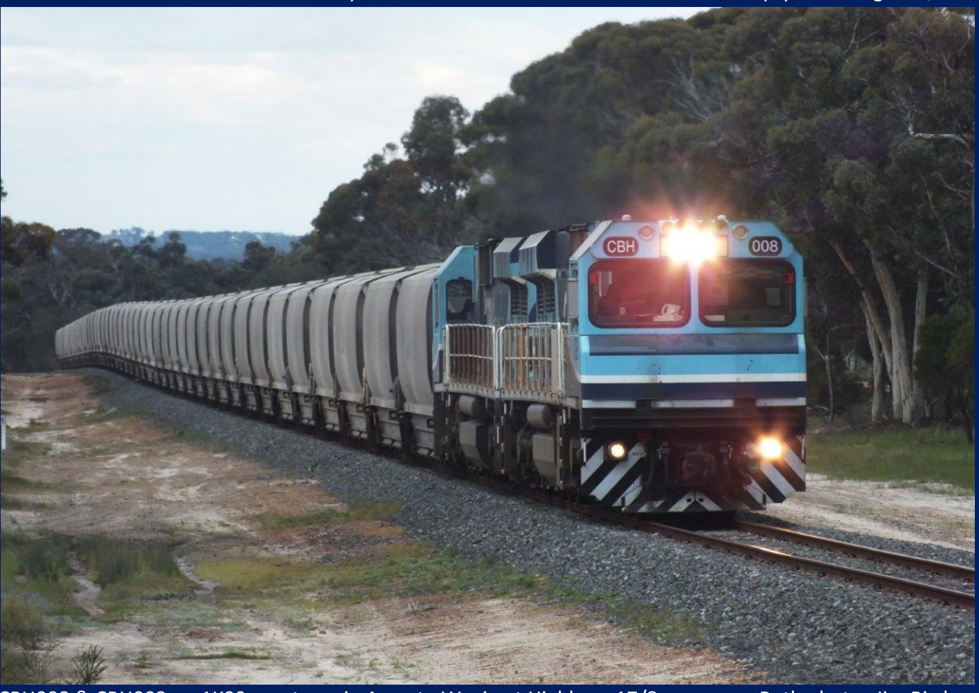
CBH008 & CBH003 on 1K09 empty grain Avon to Wagin at Highbury 17/8.