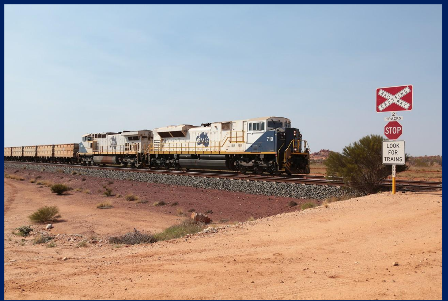
FMG 719 & 002 on empty ore at 66km crossing August 22nd.