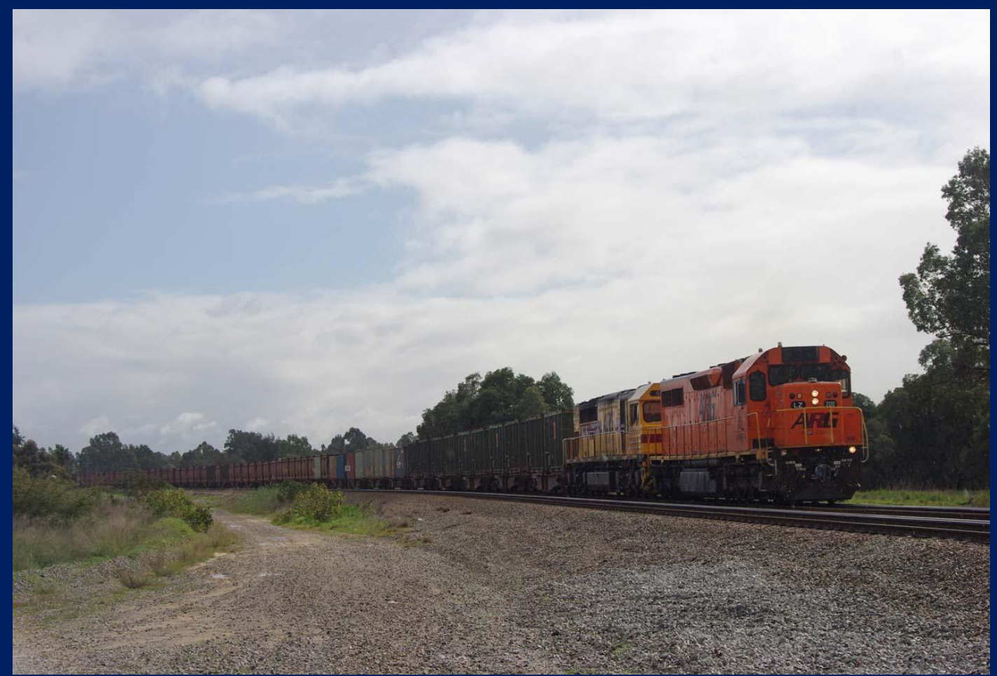
LZ3120 & Q4006 on 2430 empty sulphur ex Malcolm at Stratton July 22nd.