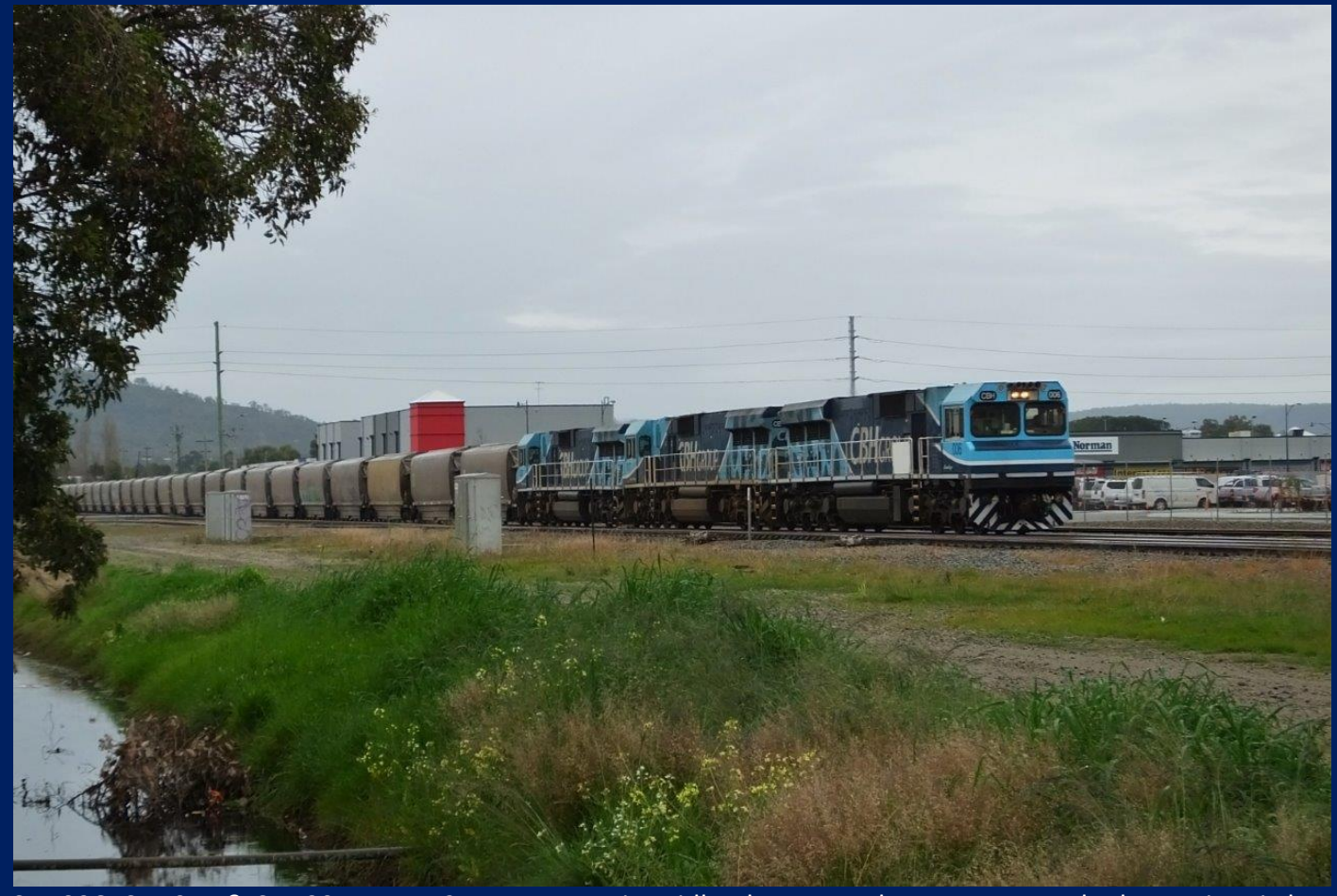
CBH006, CBH017 & CBH001 on 5K42 at Watco grain Midland August 7th.