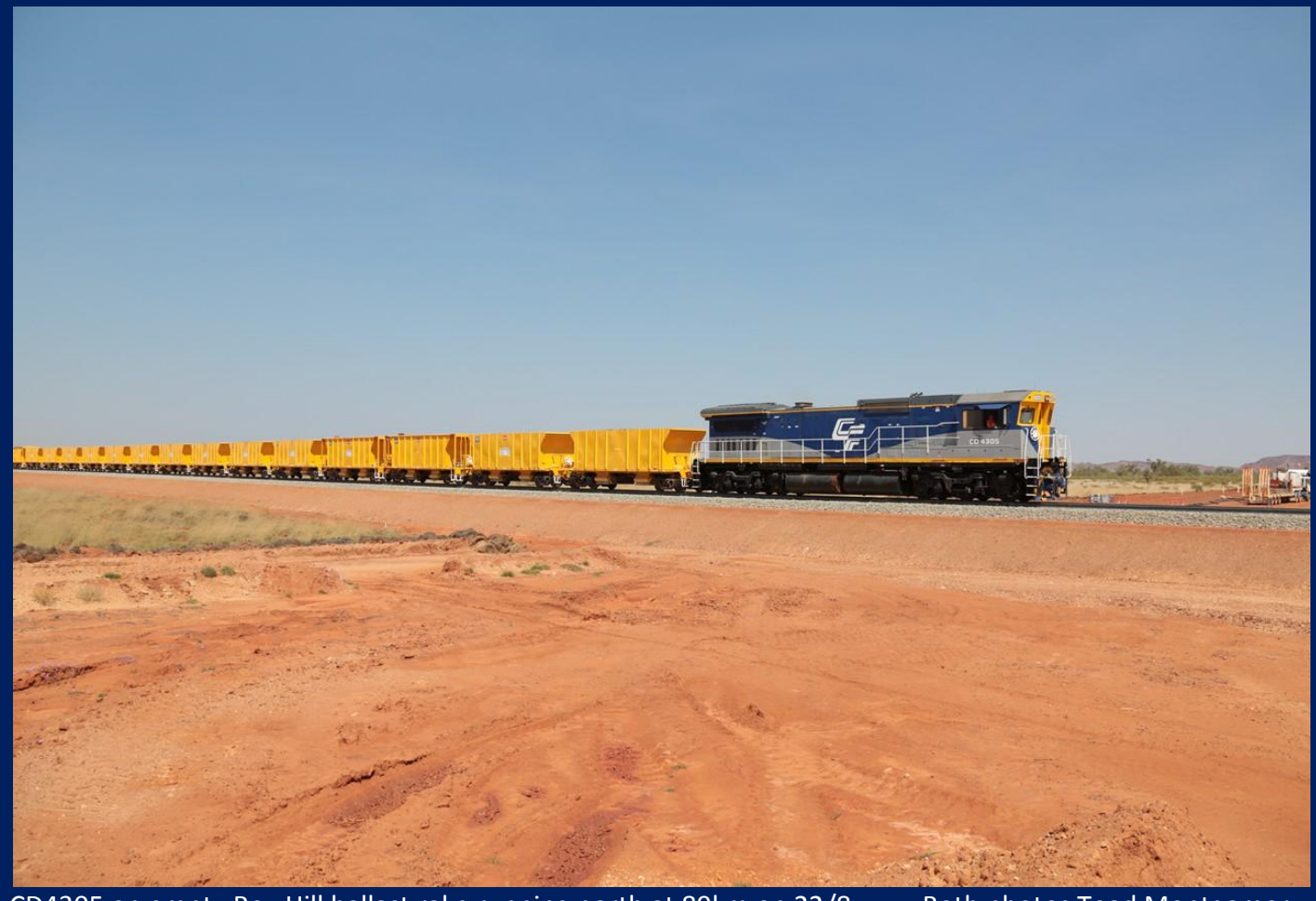
CD4305 on empty Roy Hill ballast rake running north at 89km on 22/8.