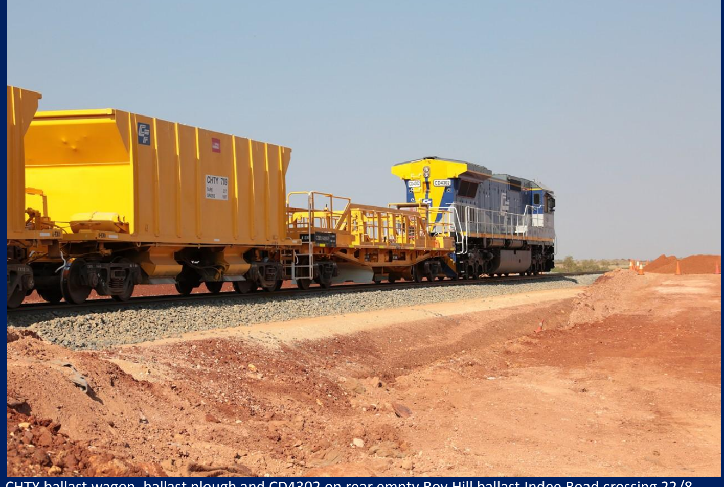
CHTY ballast wagon, ballast plough and CD4302 on rear empty Roy Hill ballast Indee Road crossing 22/8.