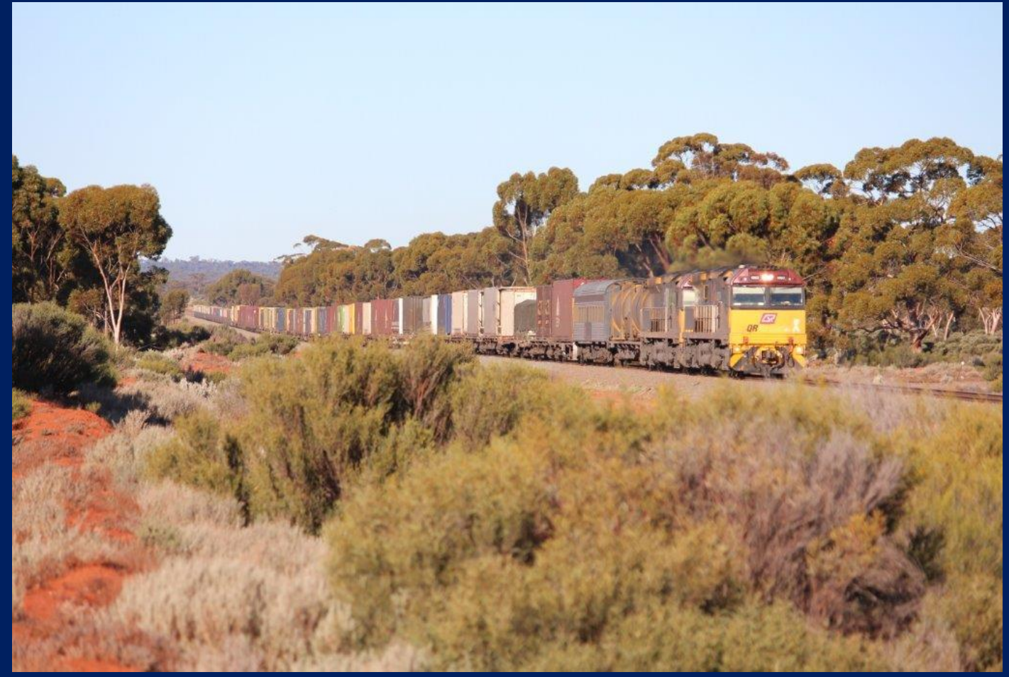
6003 & 6006 on 5MP1 Aurizon intermodal at 1750km ARTC line on August 16th.