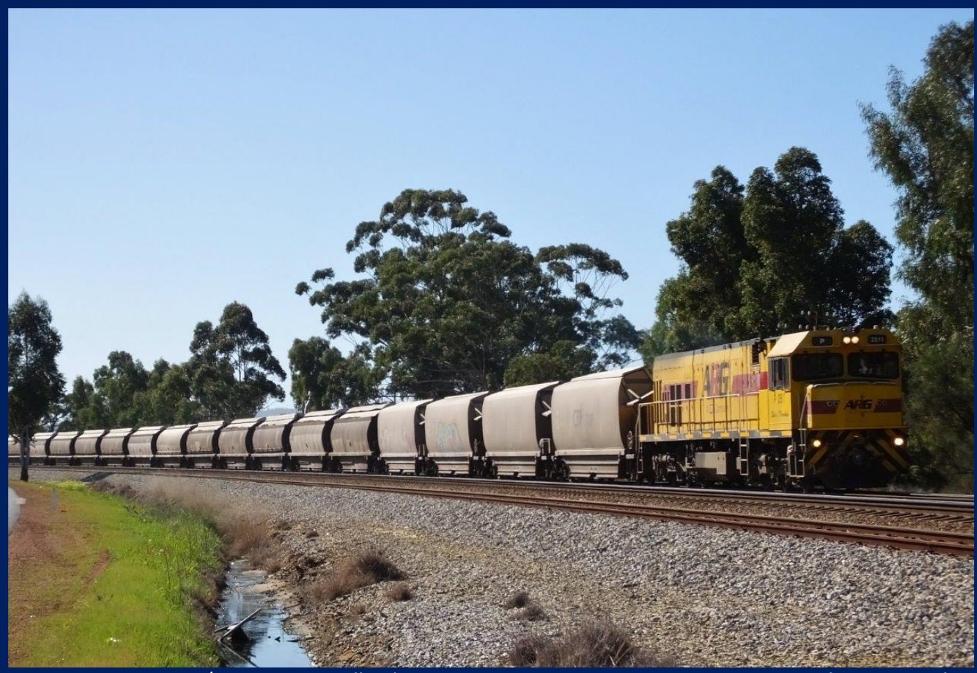
P2511 on 6K42 Watco/CBH grain at Millendon Junction August 1st.