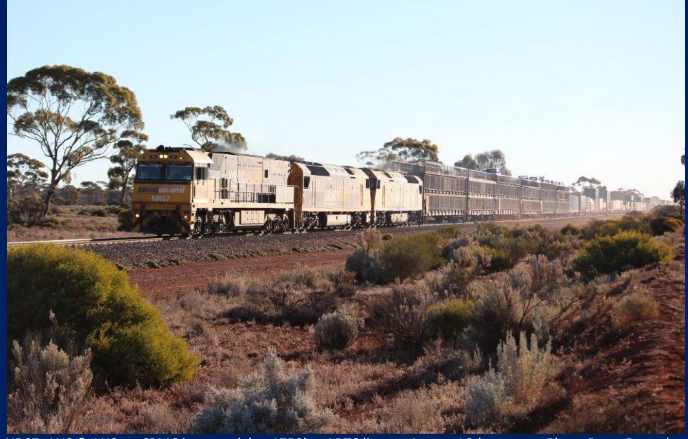
NR67, AN3 & AN8 on 6PM6 intermodal at 1750km ARTC line on August 16th.