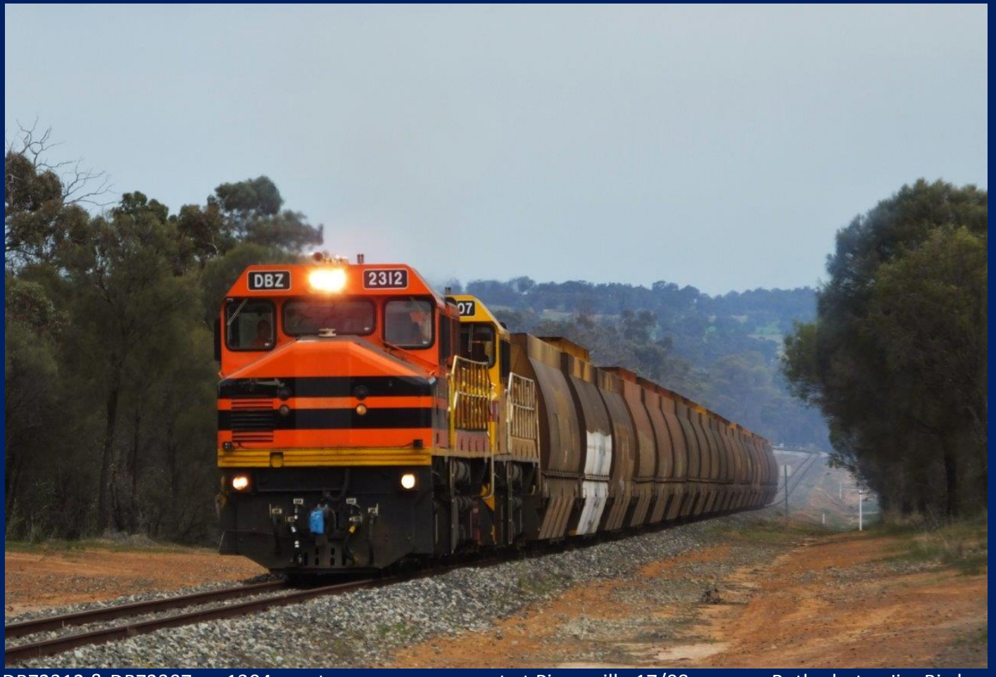
DBZ2312 & DBZ2307 on 1304 empty wagon movement at Piesseville 17/08.