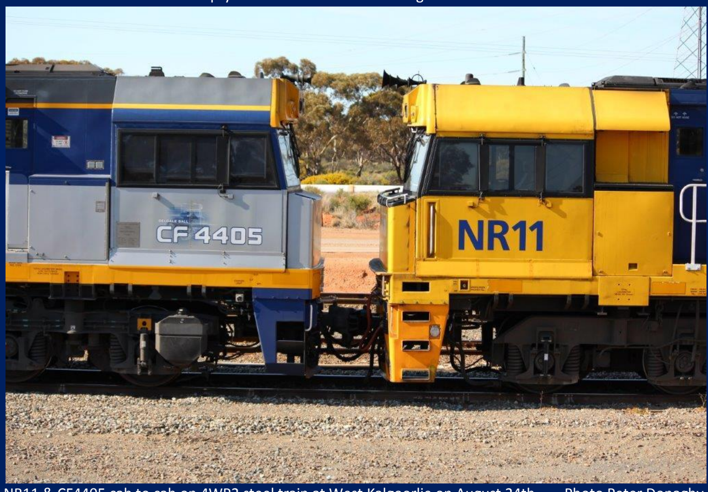
NR11 & CF4405 cab to cab on 4WP2 steel train at West Kalgoorlie on August 24th.