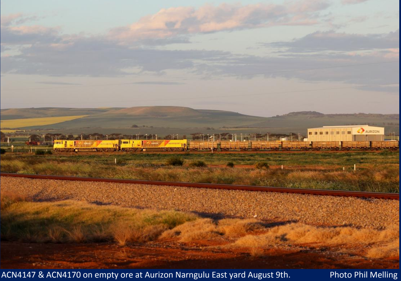
ACN4147 & ACN4170 on empty ore at Aurizon Narngulu East yard August 9th.