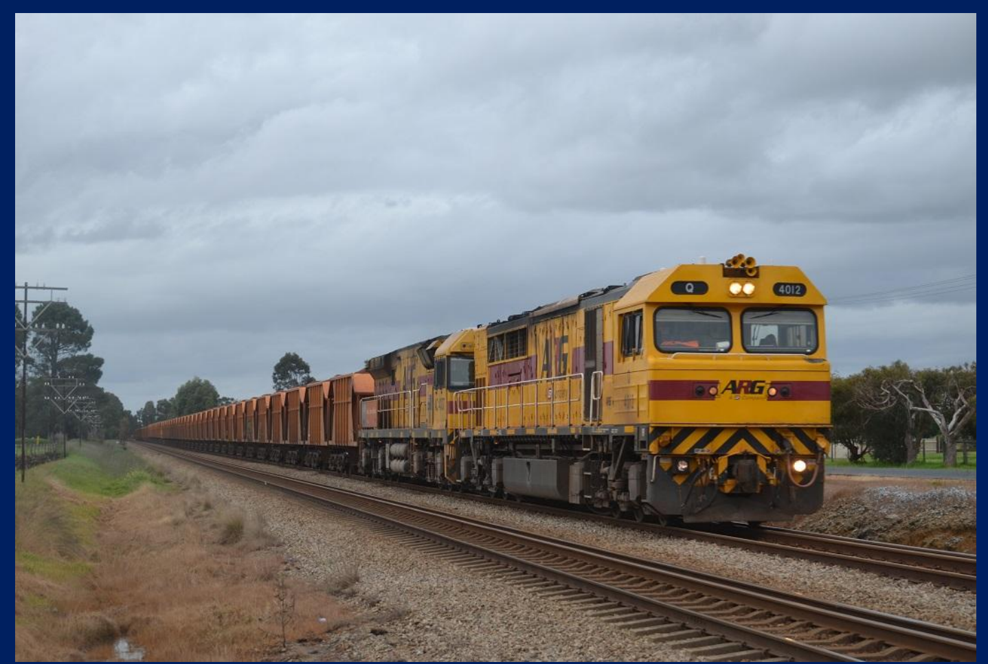
Q4012 & AC4307 on 7030 final Aurizon ore at Herne Hill on August 30th.