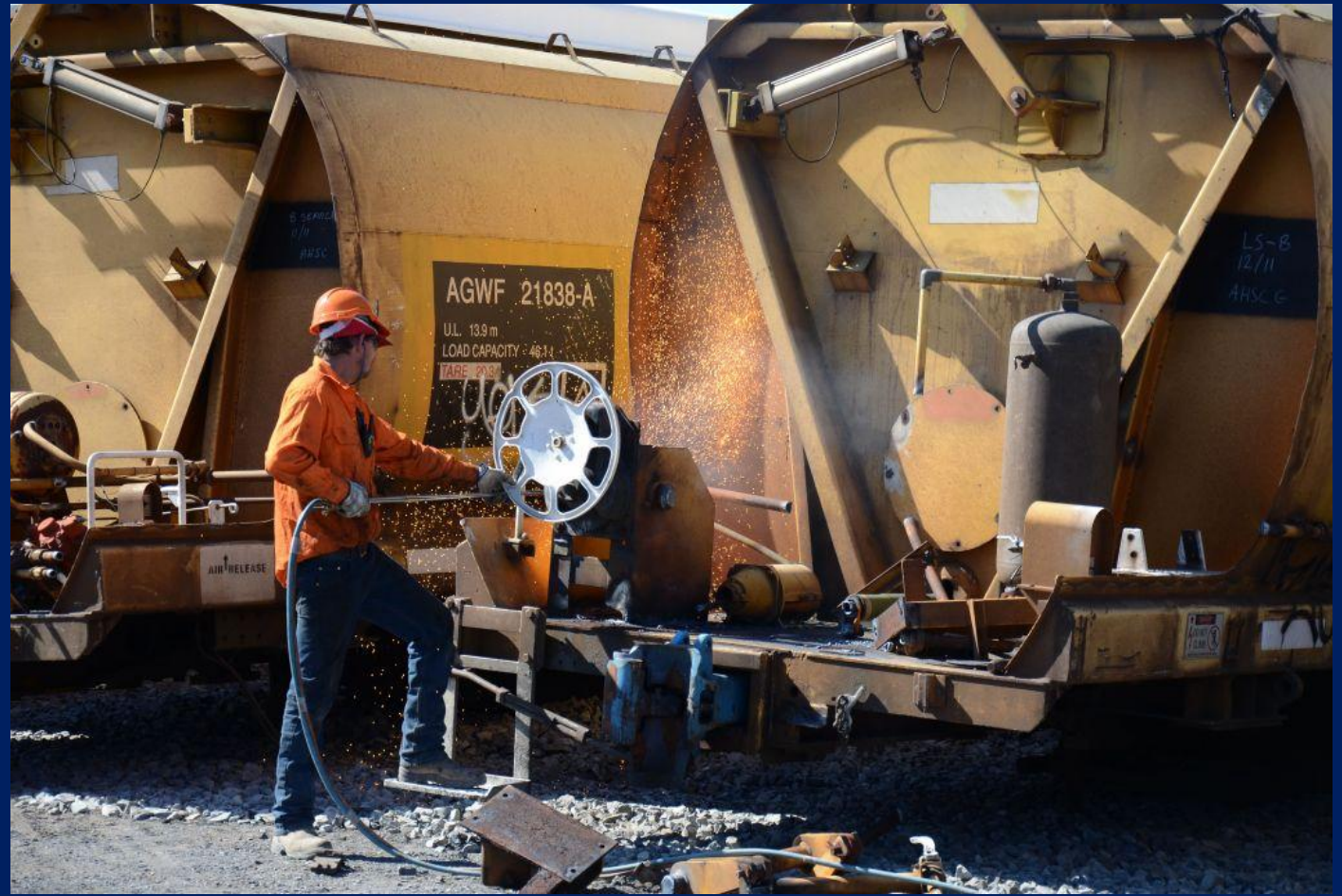
Cutting off brake equipment on AGWF grain wagon to be scrapped Goulburn NSW 15/8.