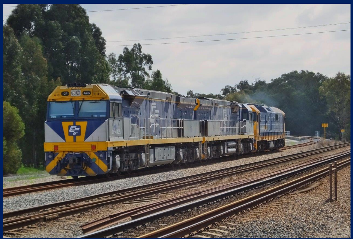
CF4405 & CF4406 being hauled up west leg Woodbridge triangle by 8118 on 3PN2 26/8.