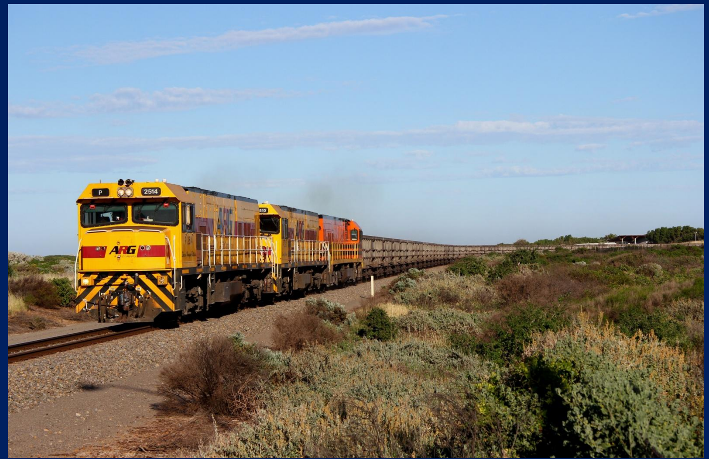
P2514, 25120 & P2507 on 7722 empty Kara Mining ore to Perenjori at Mahomets Flats 16/8.