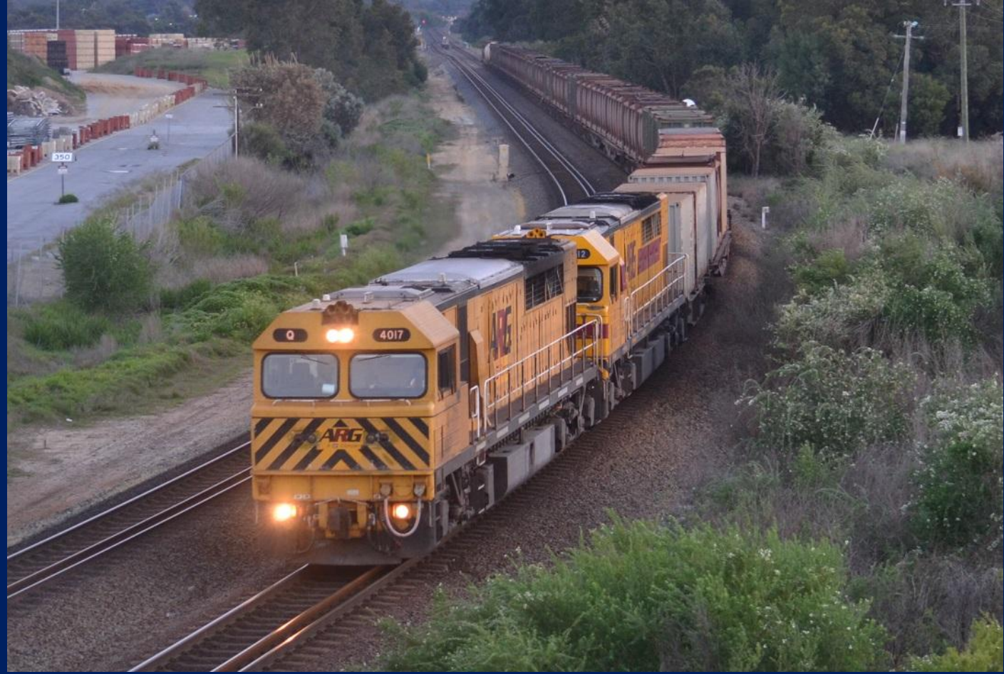
Q4017 & Q4012 on 6430 empty sulphur South Guildford August 9th.