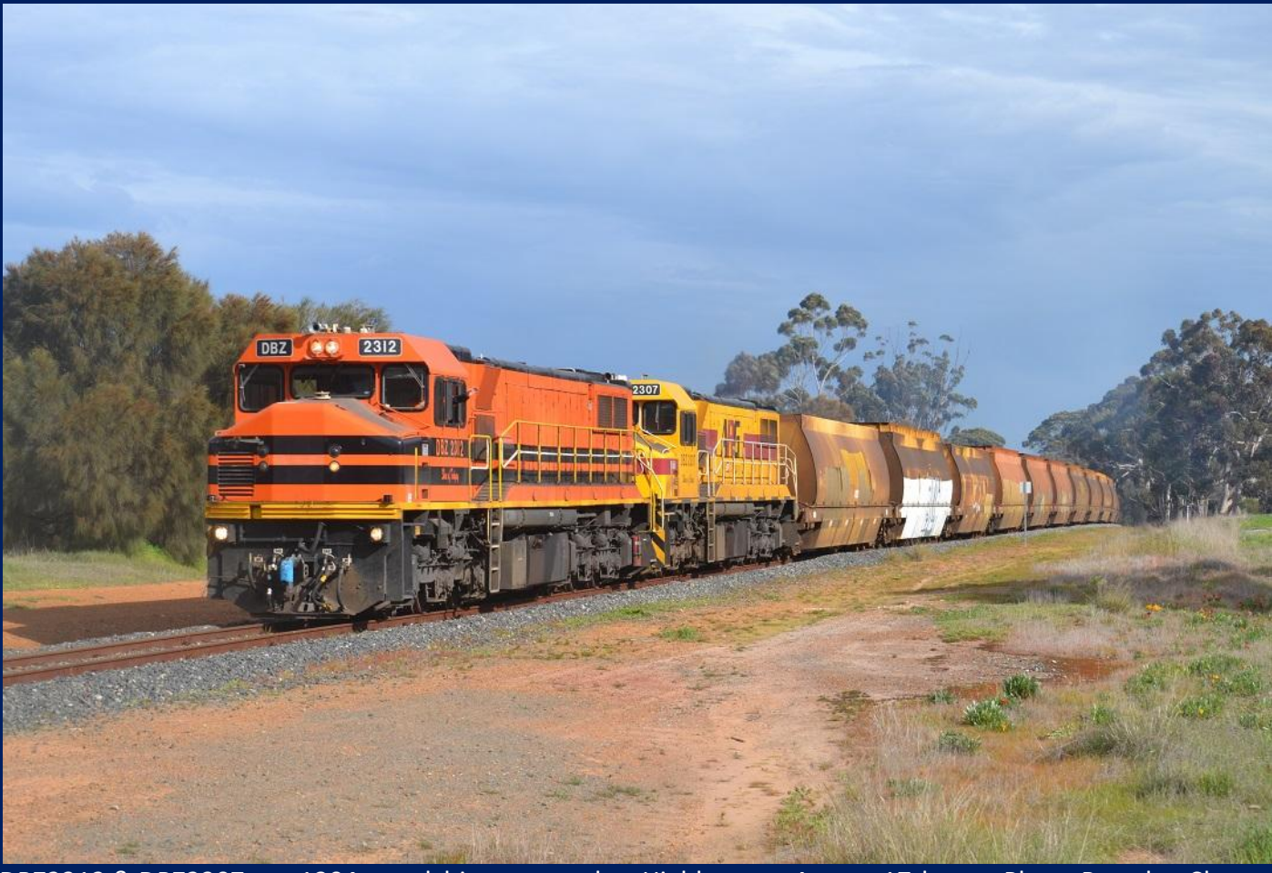
DBZ2312 & DBZ2307 run 1304 woodchip wagons thru Highbury on August 17th.