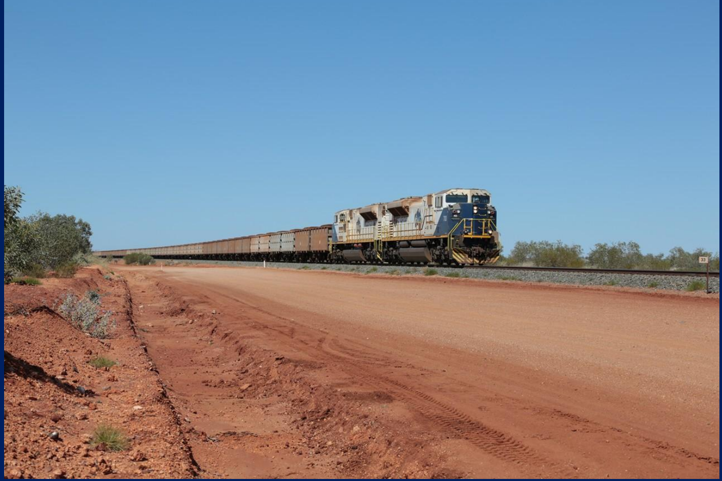
FMG 703 & 706 on loaded ore at 33km on August 19th.