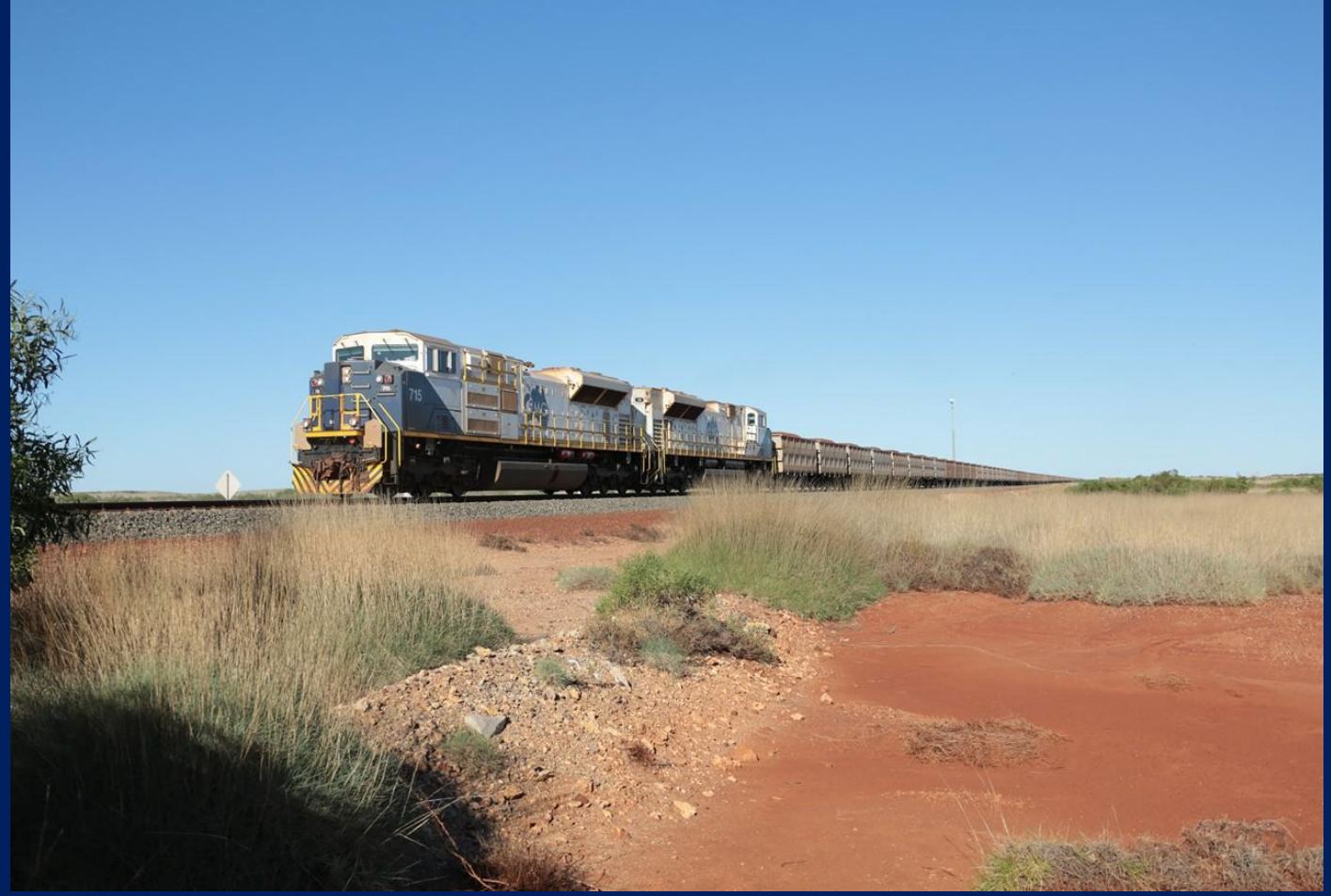
FMG 718 & 710 on loaded ore at Indee Road crossing August 19th.