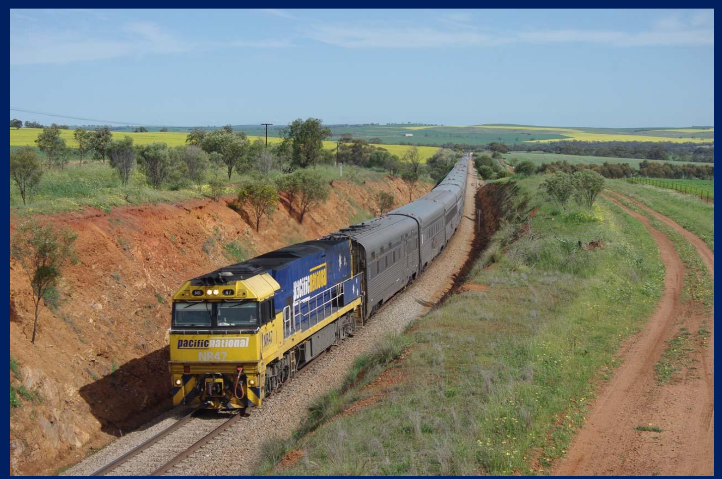
NR47 on 1PA8 Indian Pacific at Grass Valley on August 24th.