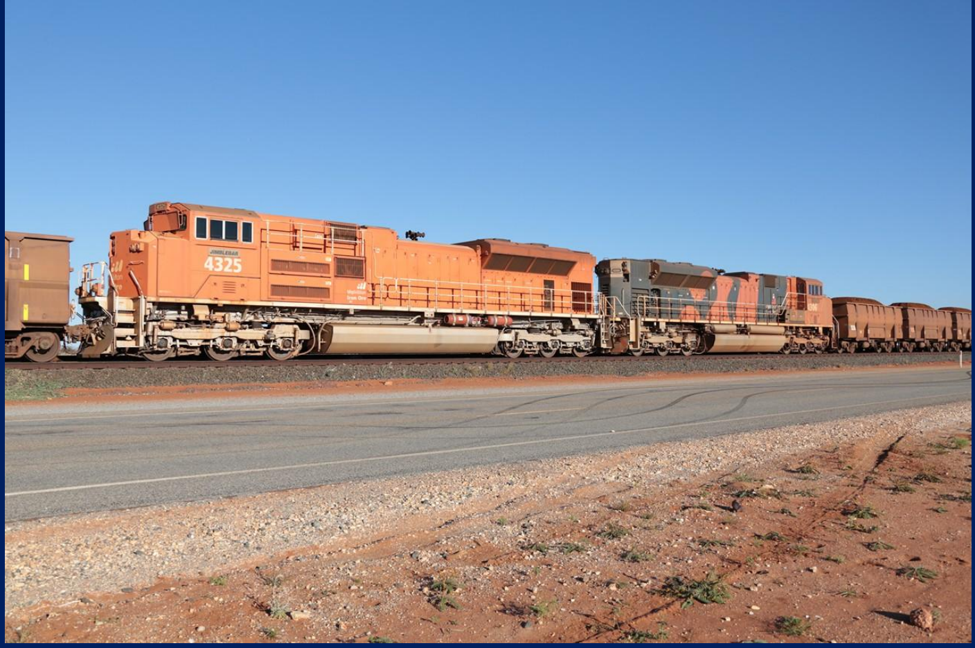
Mid train DPUs SD70ACe 4325 & 4306 on loaded ore train at Bing August 19th.