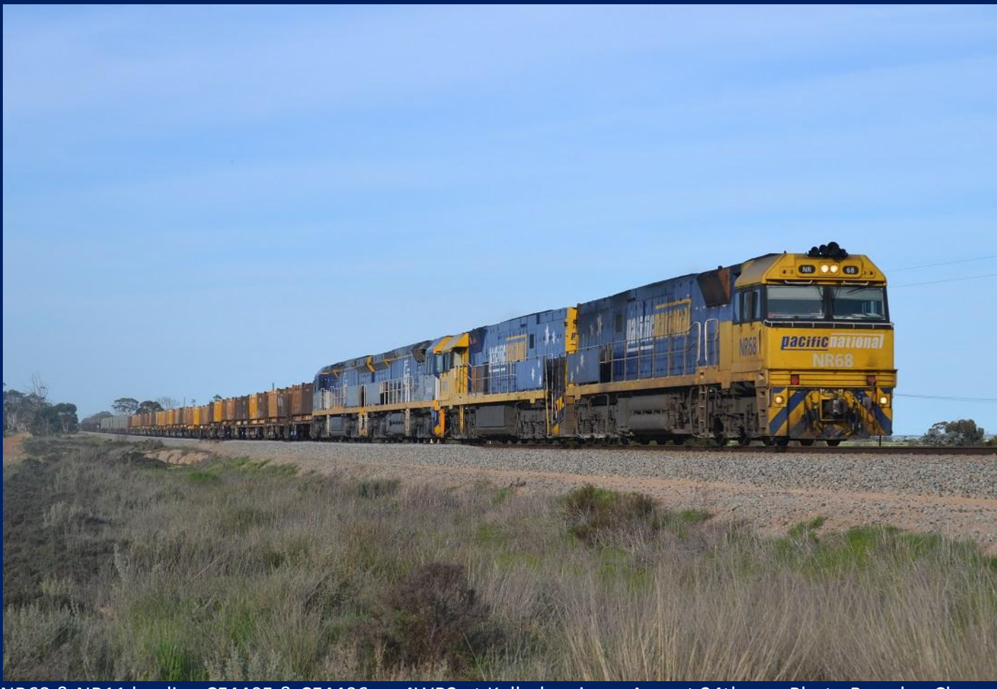
NR68 & NR11 hauling CF4405 & CF4406 on 4WP2 at Kellerberrin on August 24th.