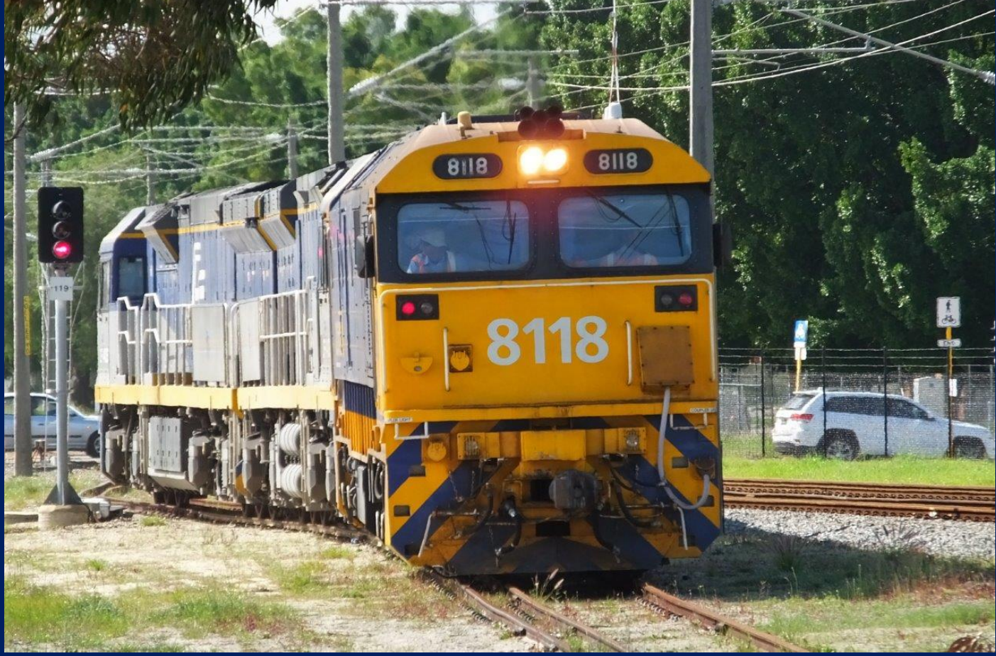
8118 hauls CF4406 & CF4405 onto Bassendean siding on 3PN2 August 26th.