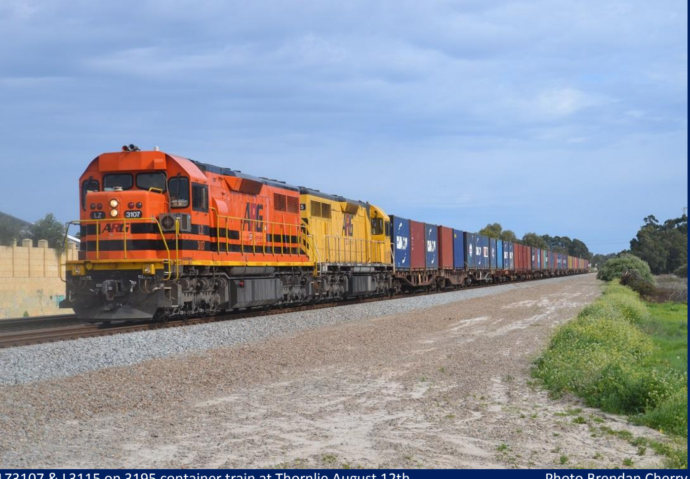
LZ3107 & L3115 on 3195 container train at Thornlie August 12th.