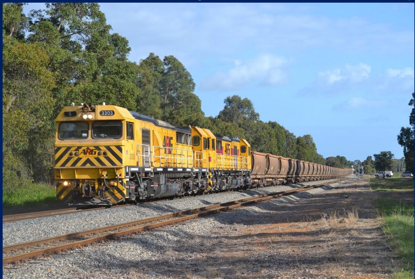
S3303 & S3309 on 6944 bauxite at Mundijong August 22nd.