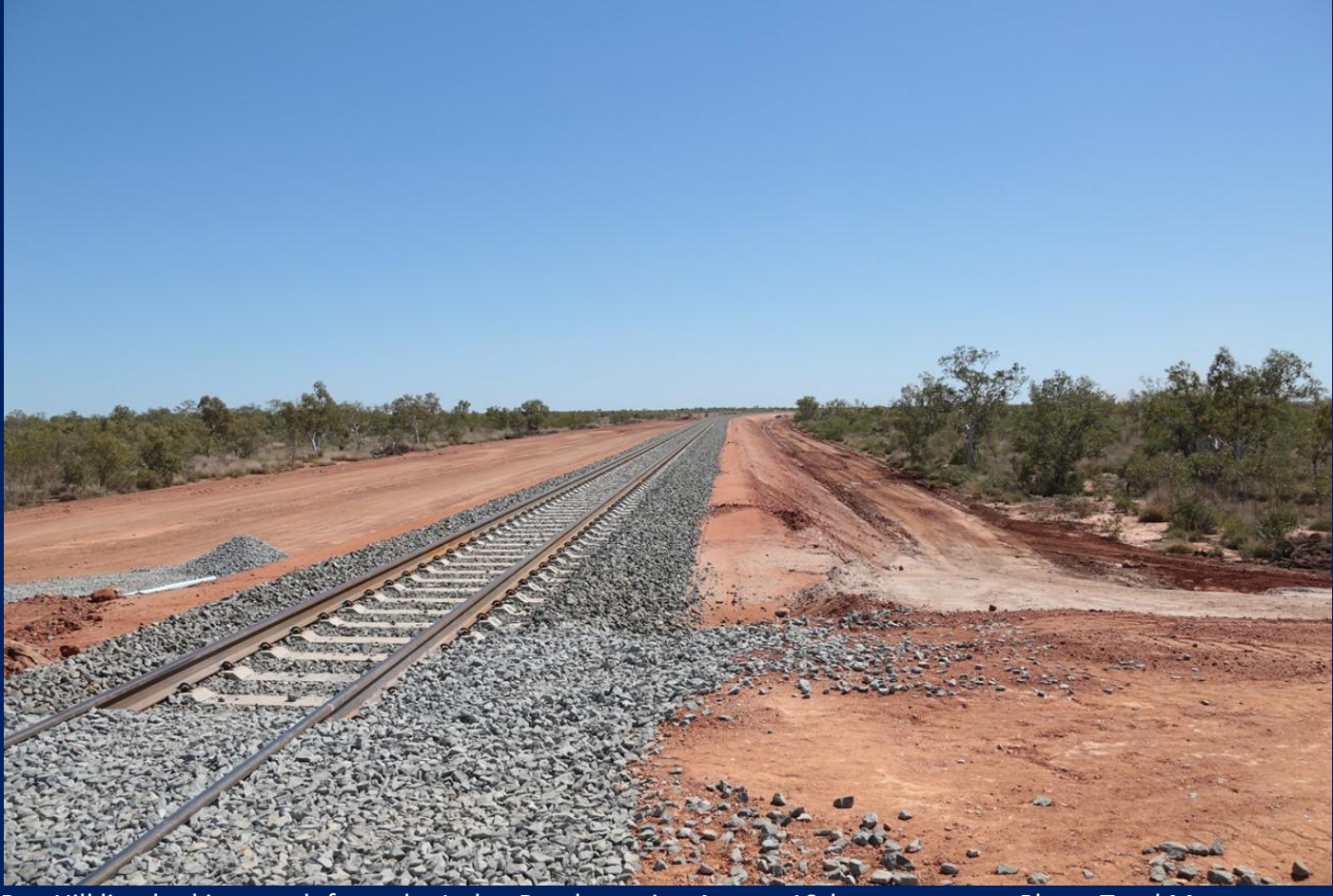
Roy Hill line looking south from the Indee Road crossing August 19th.