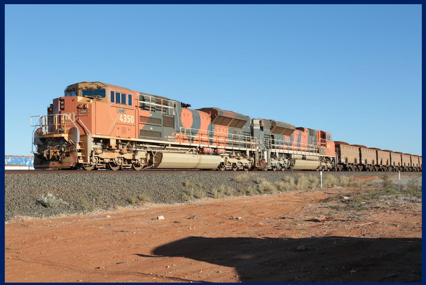
4350 & 4418 on loaded waiting to enter congested Nelson Point Yard 19/8.