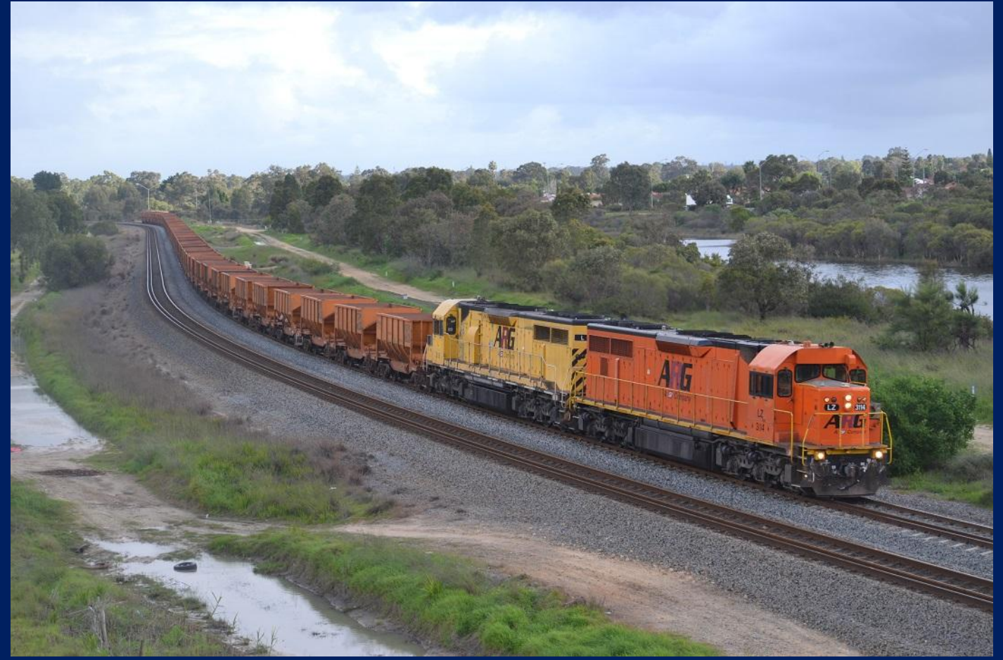
LZ3114 & LZ3115 on 2033 empty ore at Wattle Grove August 18th.