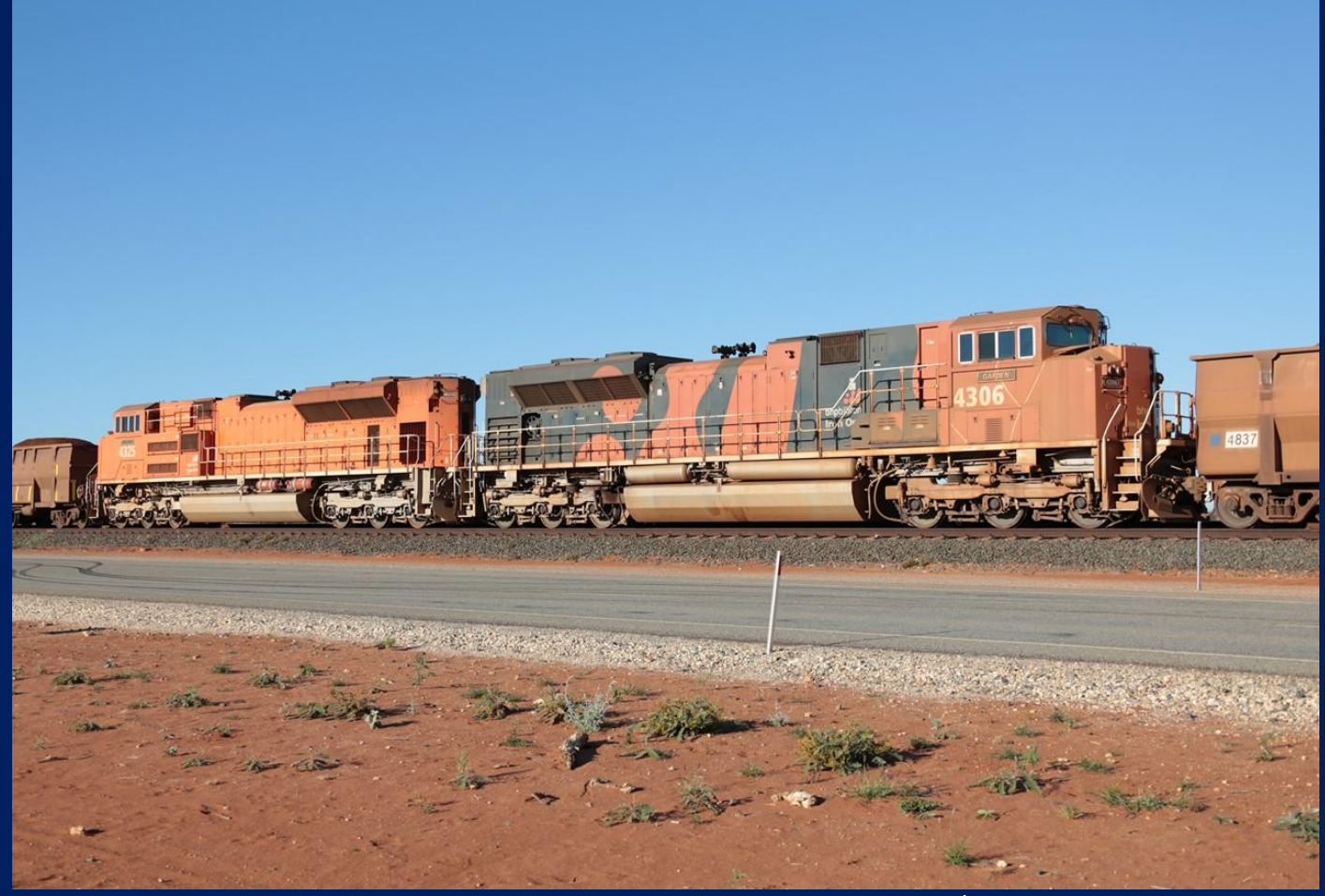
Soon to be withdrawn SD70ACe 4306 still operating as remote DPU at Bing 19/8.