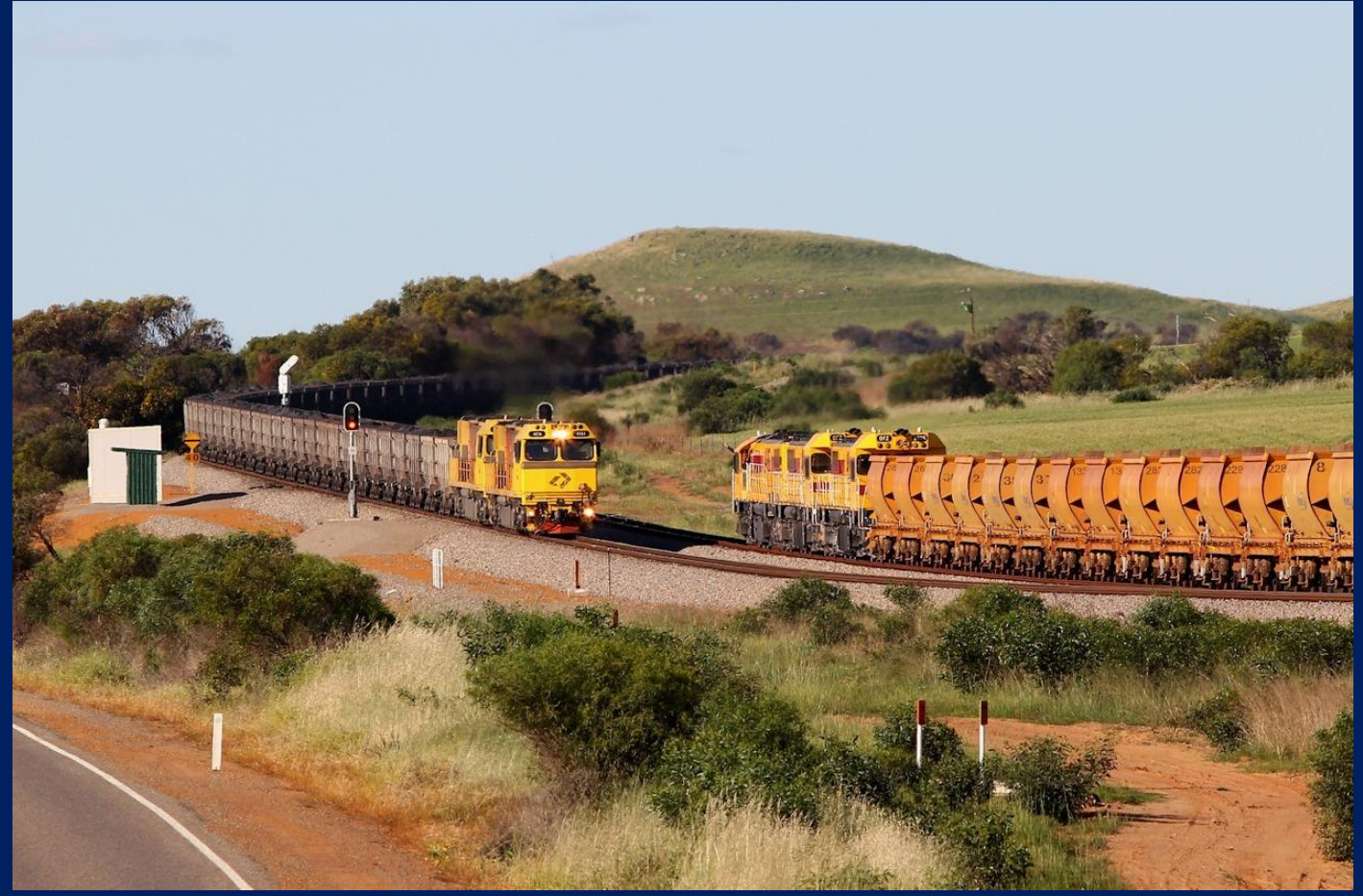
ACN4144 & ACN4145 on 7763 Karara ore crossing DFZ2405, DFZ2407 & DFZ2406 [first tipple headed DFZs for about a year] on Mt Gibson Perenjori ore at Grants crossing loop August 16th.