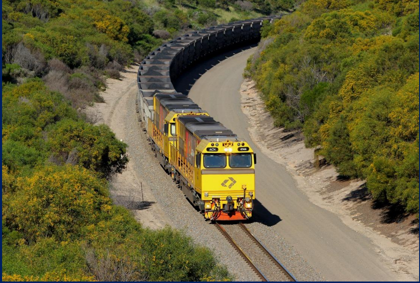
ACN4144 & ACN4145 on 1763 Karara ore descent thru Mt Tarcoola on 24/8.