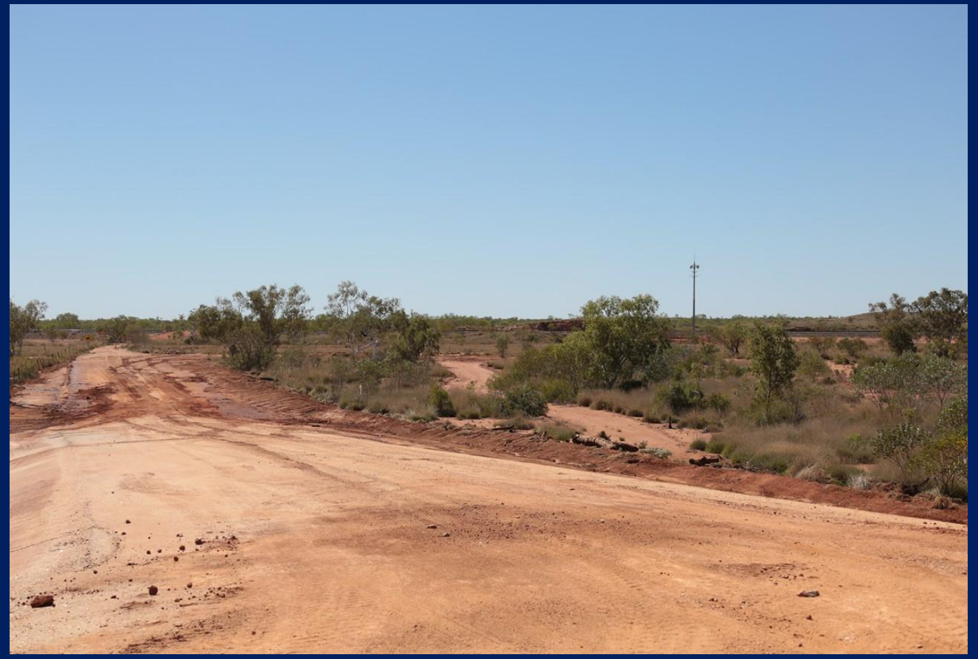
FMG line from Roy Hill line at Indee Road crossing August 19th.