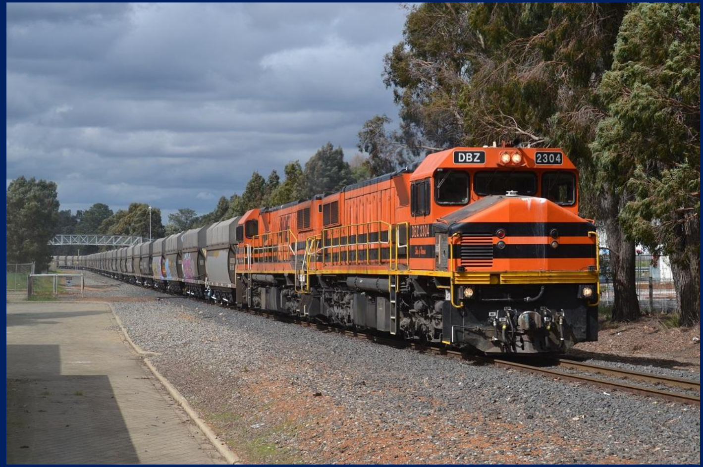
DBZ2304 & DBZ2313 on 2556 coal train at Collie August 25th.