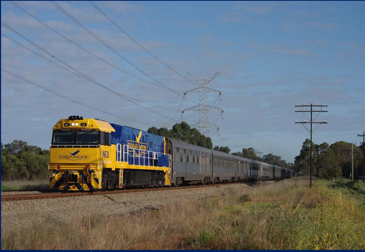
NR28 in Hybrid Indian Pacific livery at Middle Swan August 23rd.