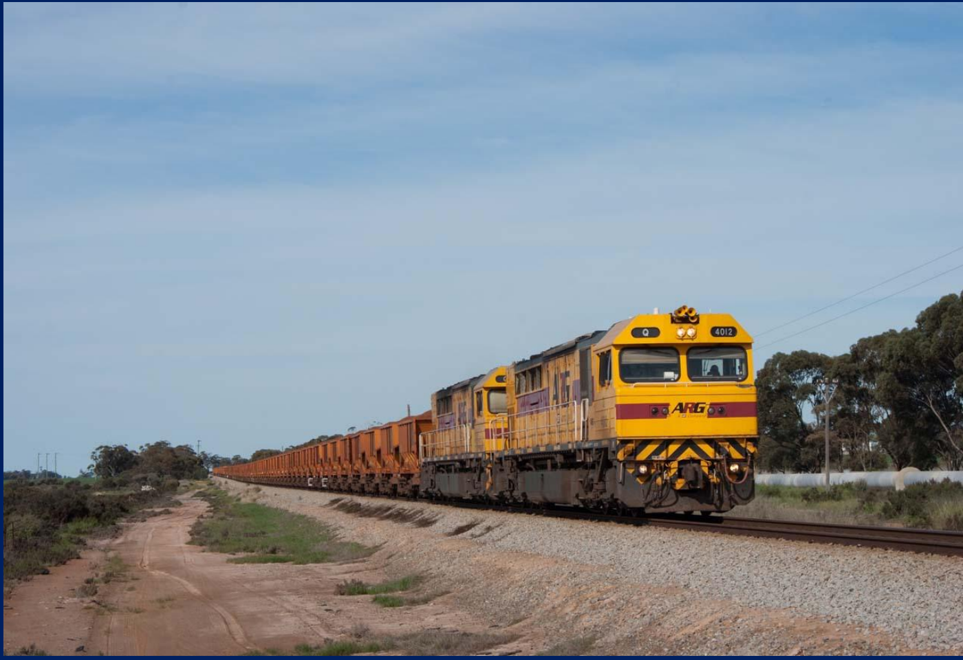
Q4010 & Q4019 on 1030 ore at Meckering August 24th.