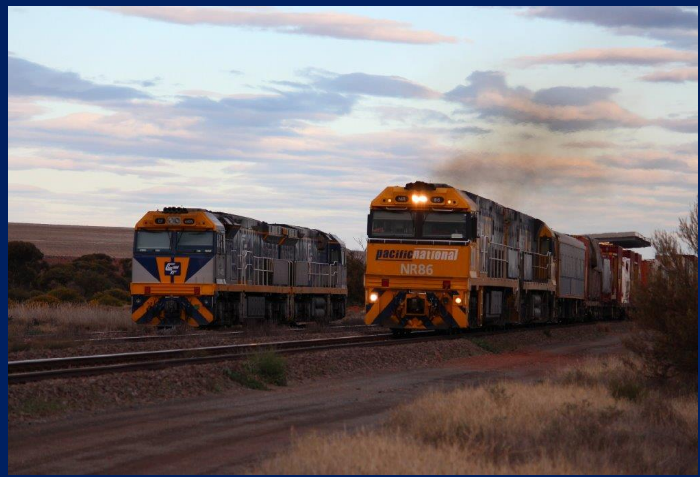
NR86 & NR102 on 3MP5 pass CF4405 & CF4406 stabled in Engineers siding Parkeston August 21st.