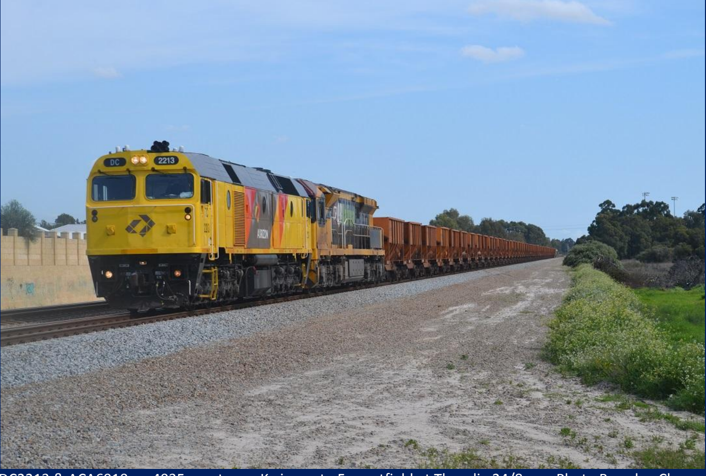
DC2213 & ACA6010 on 4035 empty ore Kwinana to Forrestfield at Thornlie 24/8.