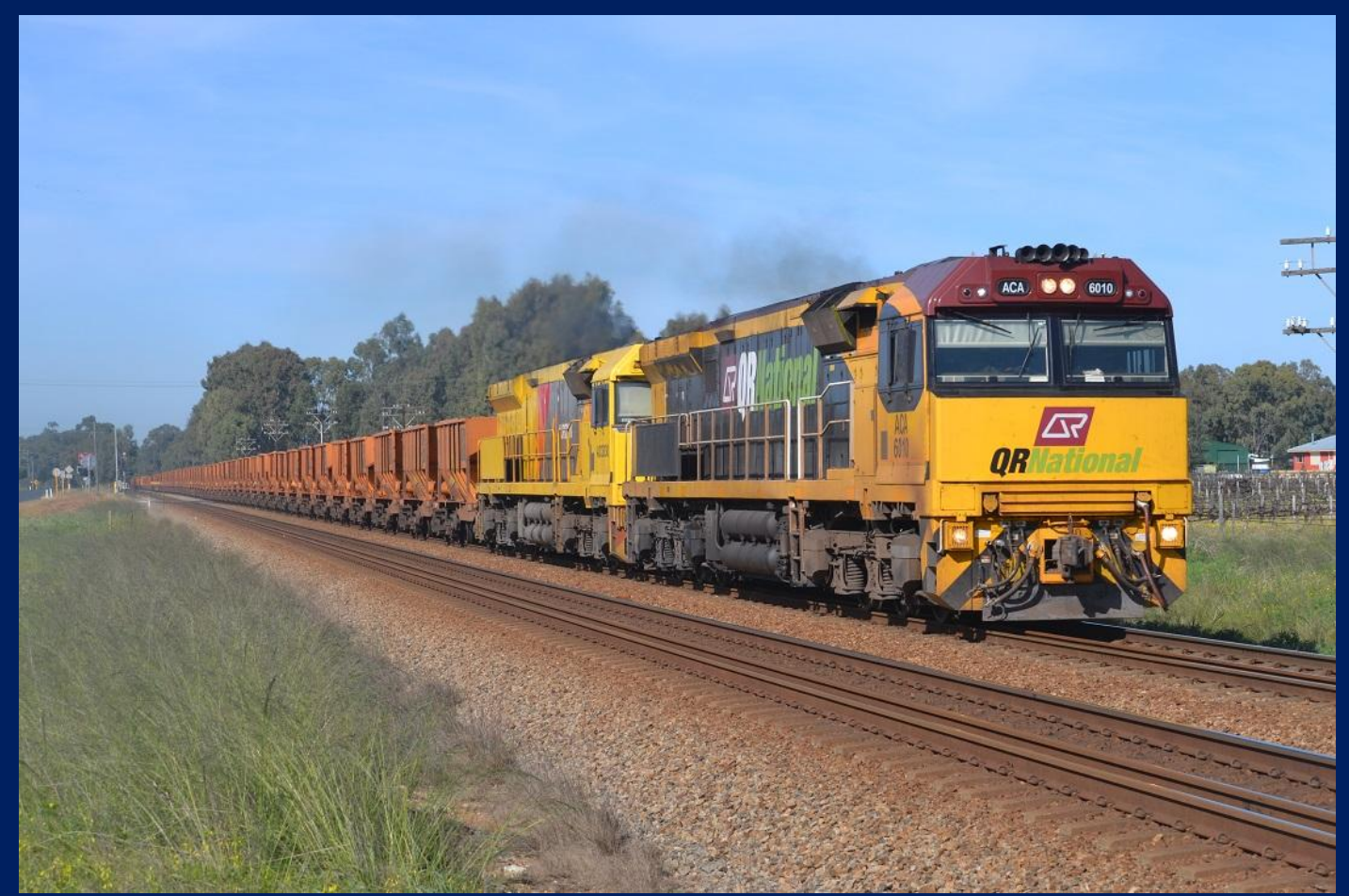
ACA6010 & ACC6030 on 1035 empty ore at Herne Hill August 24th.