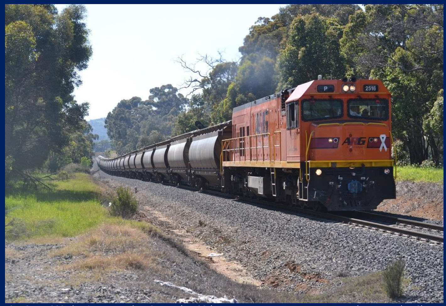
P2516 on 7902 alumina at Burekup September 20th.