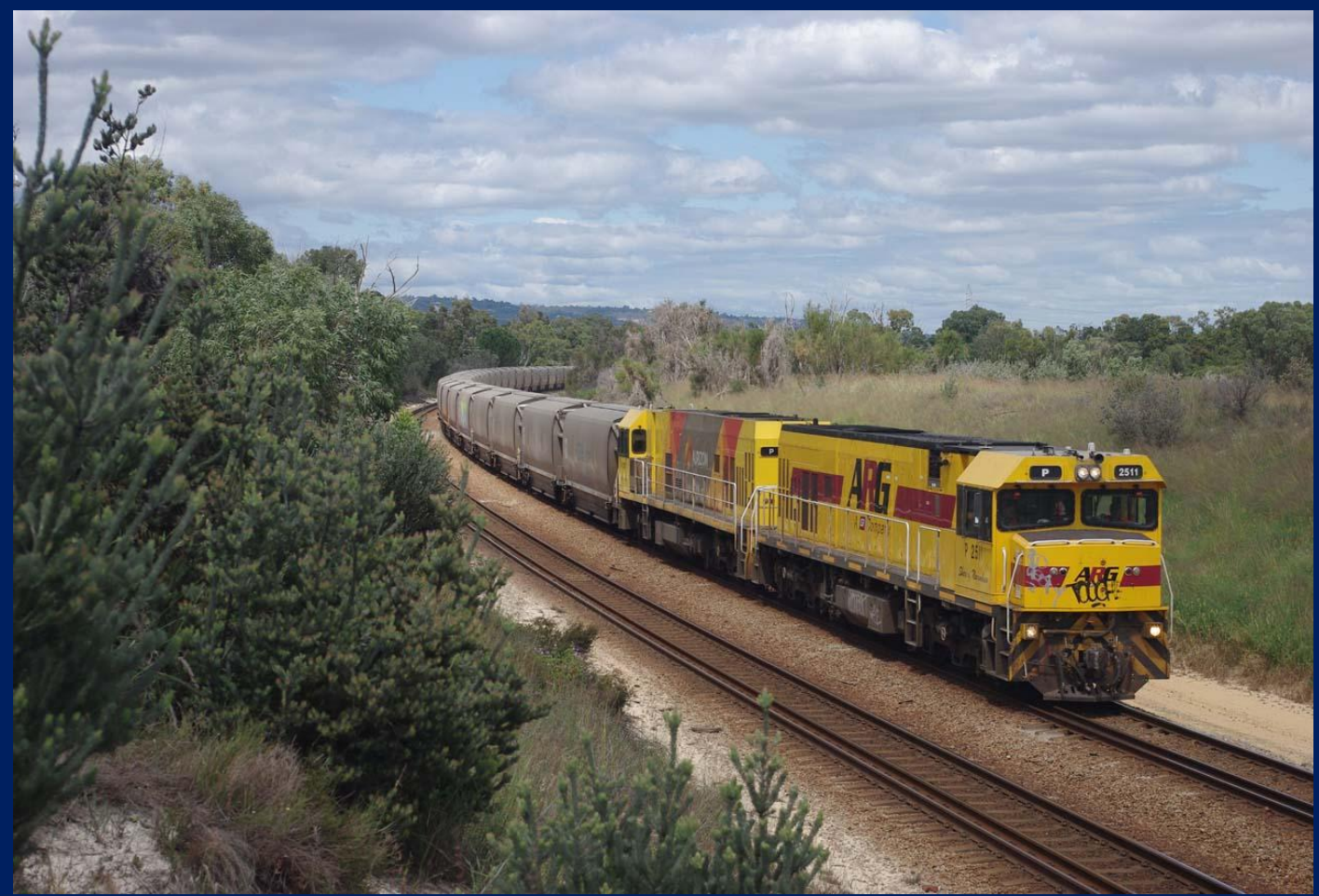
P2511 & P2517 on 6K43 empty Watco grain with CBHN wagons Swan View 26/9.