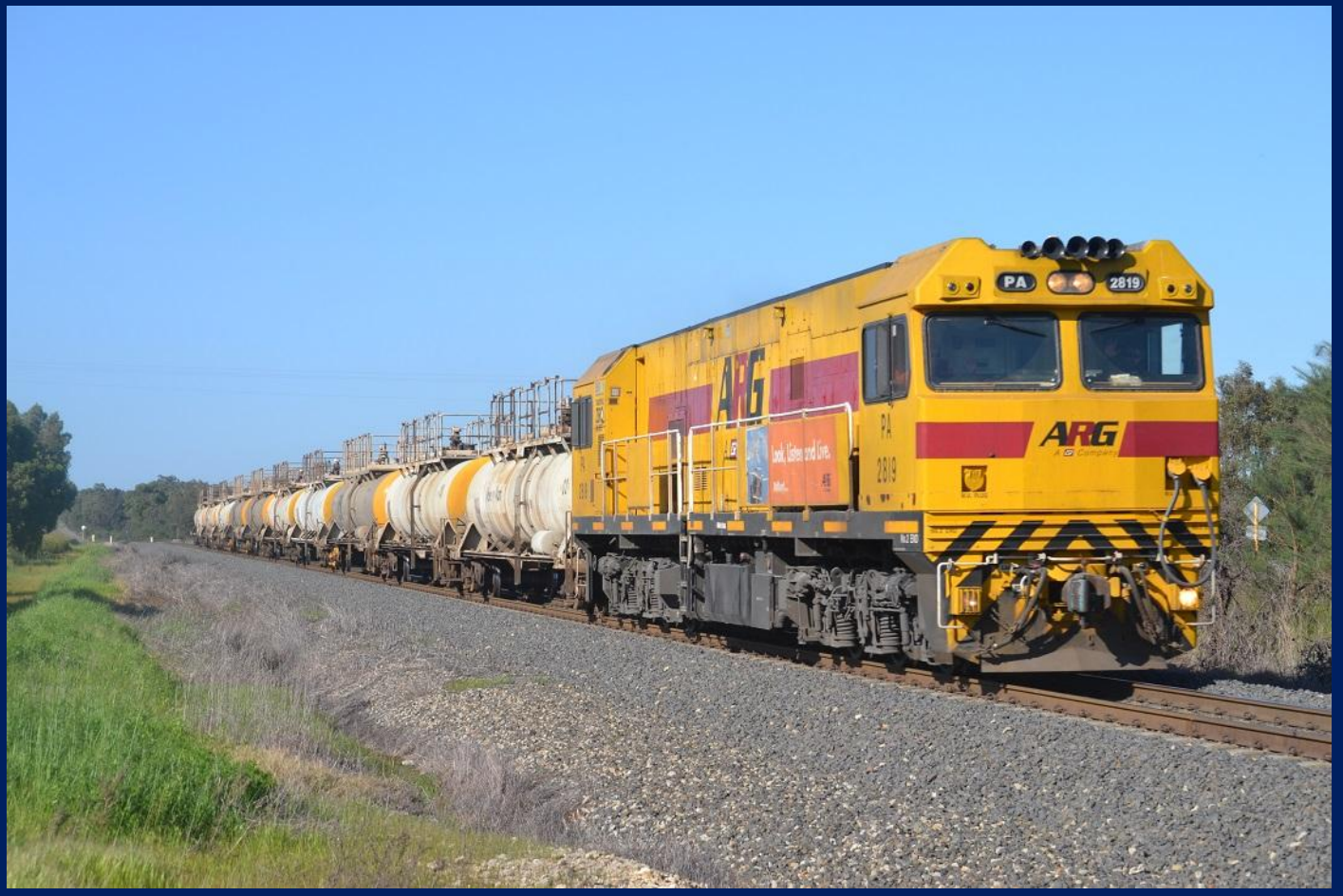
PA2819 on 7902 caustic soda tankers at Brunswick September 20th.