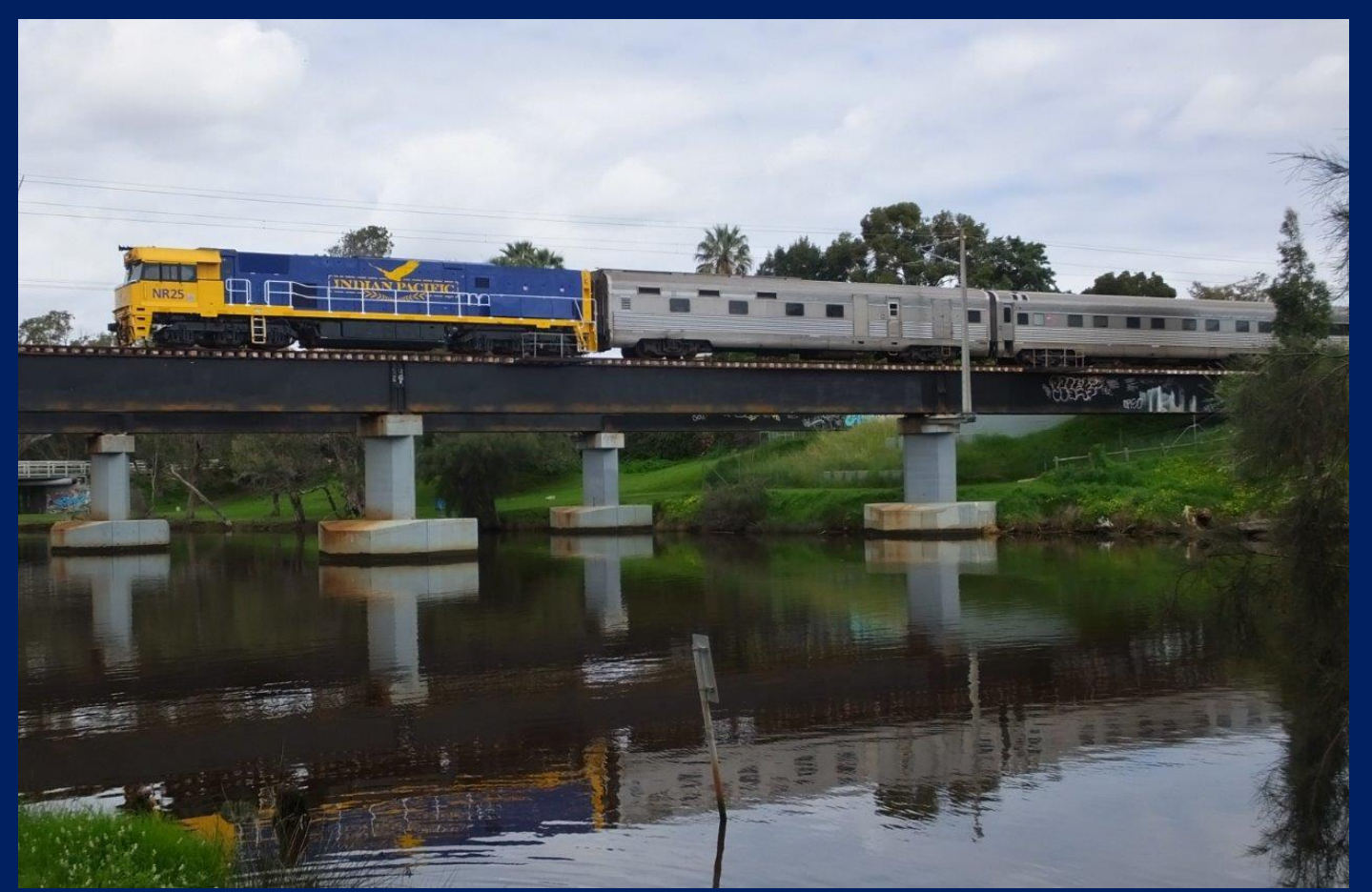
NR25 on 4PA8 Indian Pacific crossing Swan River at Guildford September 10th.