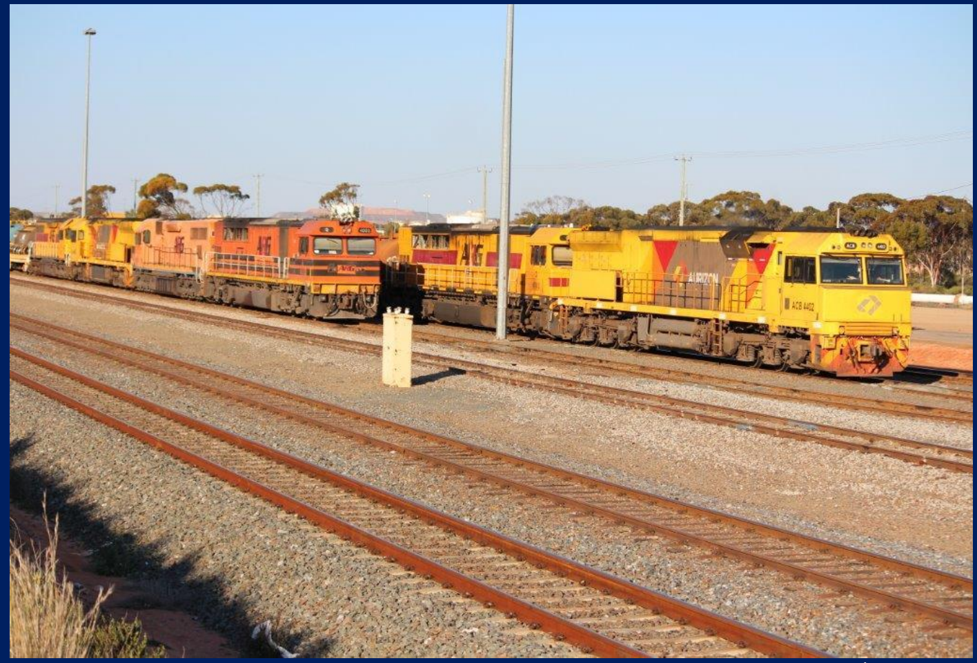
Q4009, L3118, ACB4404 & LZ3112 on 6443 with ACB4402 & Q4012 on 6426 West Kalgoorlie 26/9.