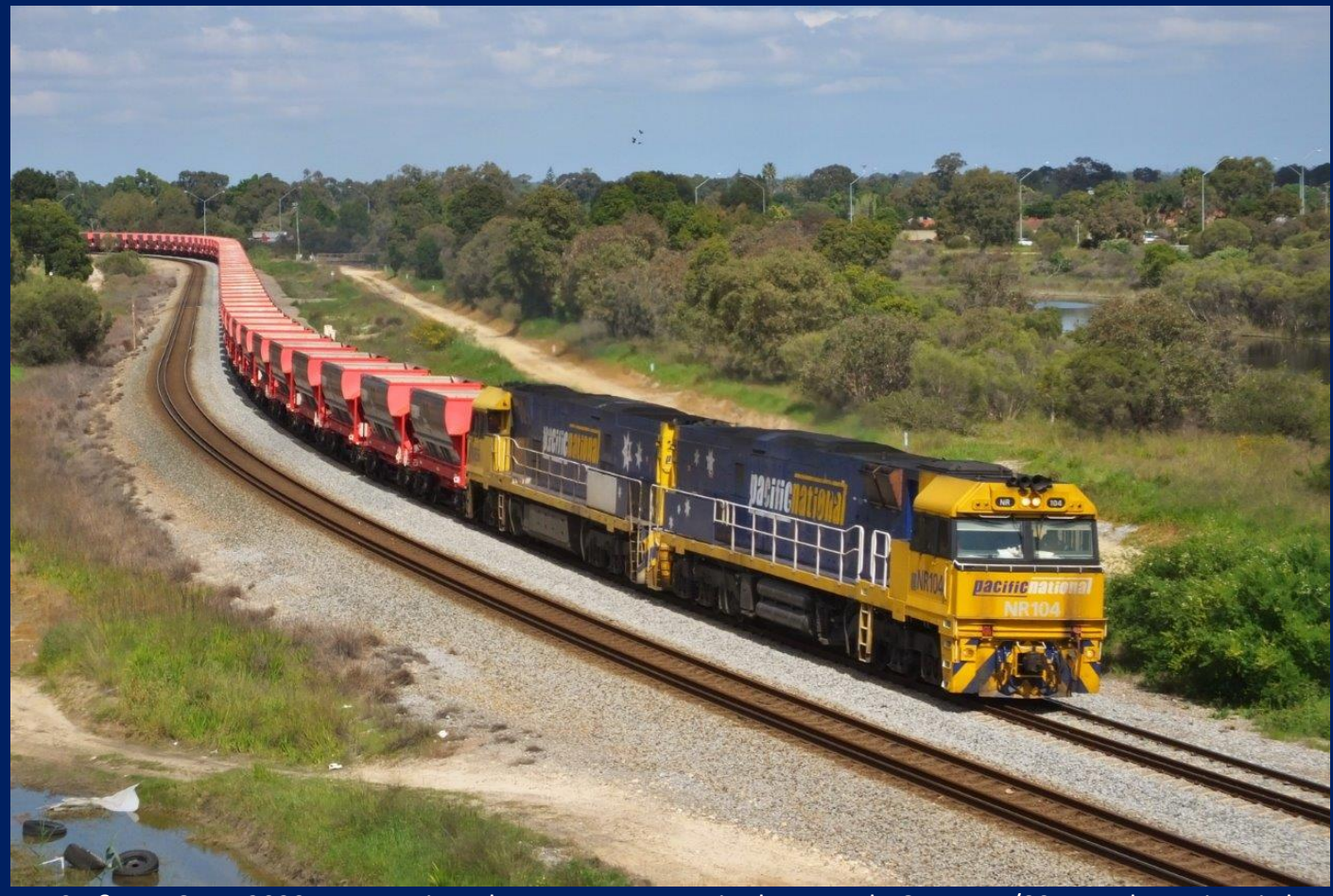
NR104 & NR56 run 2033 empty Mineral Resources ore train thru Wattle Grove 15/09.