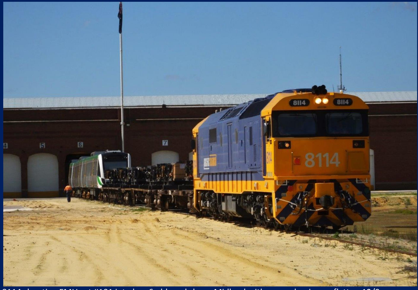
8114 shunting EMU set #101 into bay 6 old workshops Midland with power bogies on flattop 12/9.