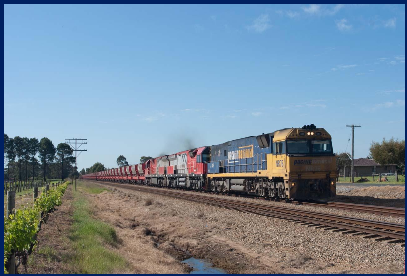
NR76, MRL004 & dead MRL001 on 5030 ore, NR haulage trial at Herne Hill on 25/09.