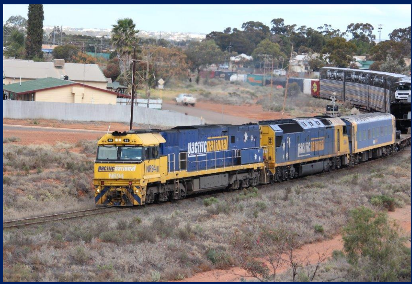
NR94 & AN4 on 6PM6 intermodal departing Kalgoorlie August 30th.