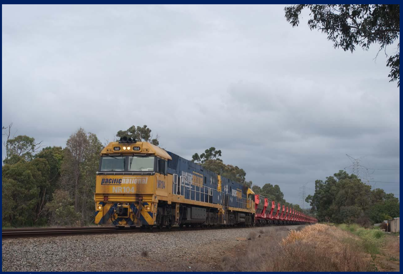
NR104 & NR56 on 2033 empty ore at Swan View September 8th.