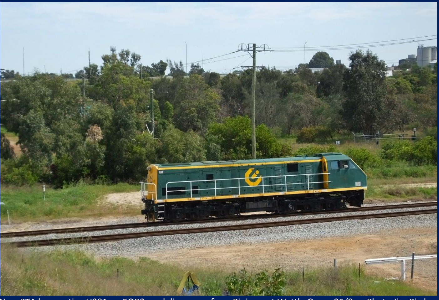
New PTA locomotive U201 on 5QB2 on delivery run from Pinjarra at Wattle Grove 25/9. Photo