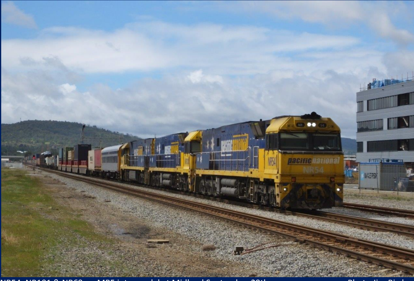
NR54, NR101 & NR69 on MP5 intermodal at Midland September 29th.