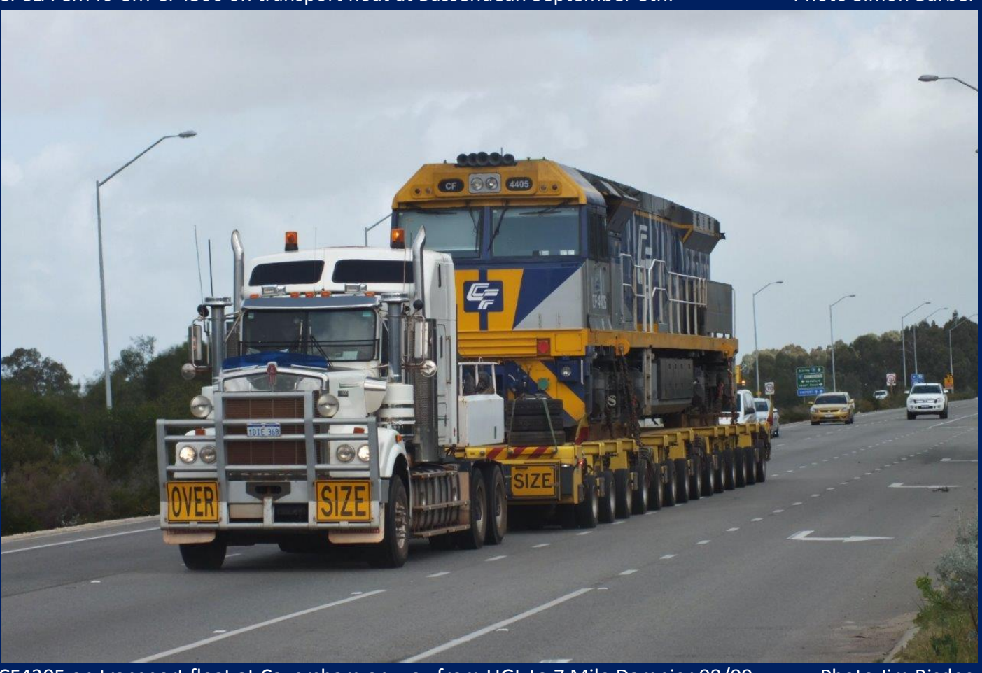
CF4305 on transport float at Caversham on way from UGL to 7 Mile Dampier 08/09.