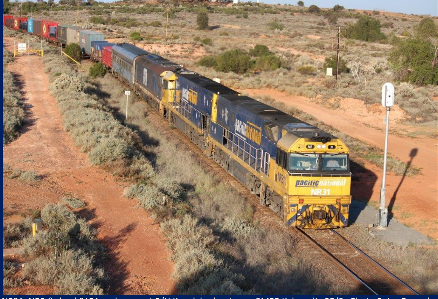
NR31, NR5 & dead 8121 replacement P/N Kewdale shunter on 3MP5 Kalgoorlie 25/9.