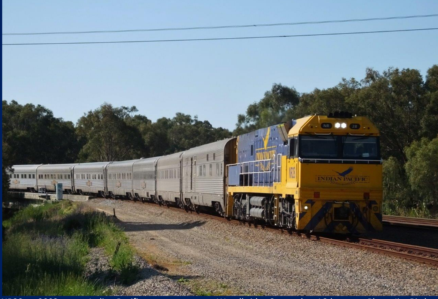
NR28 on 3003 empty Indian Pacific car movement at Woodbridge September 16th.