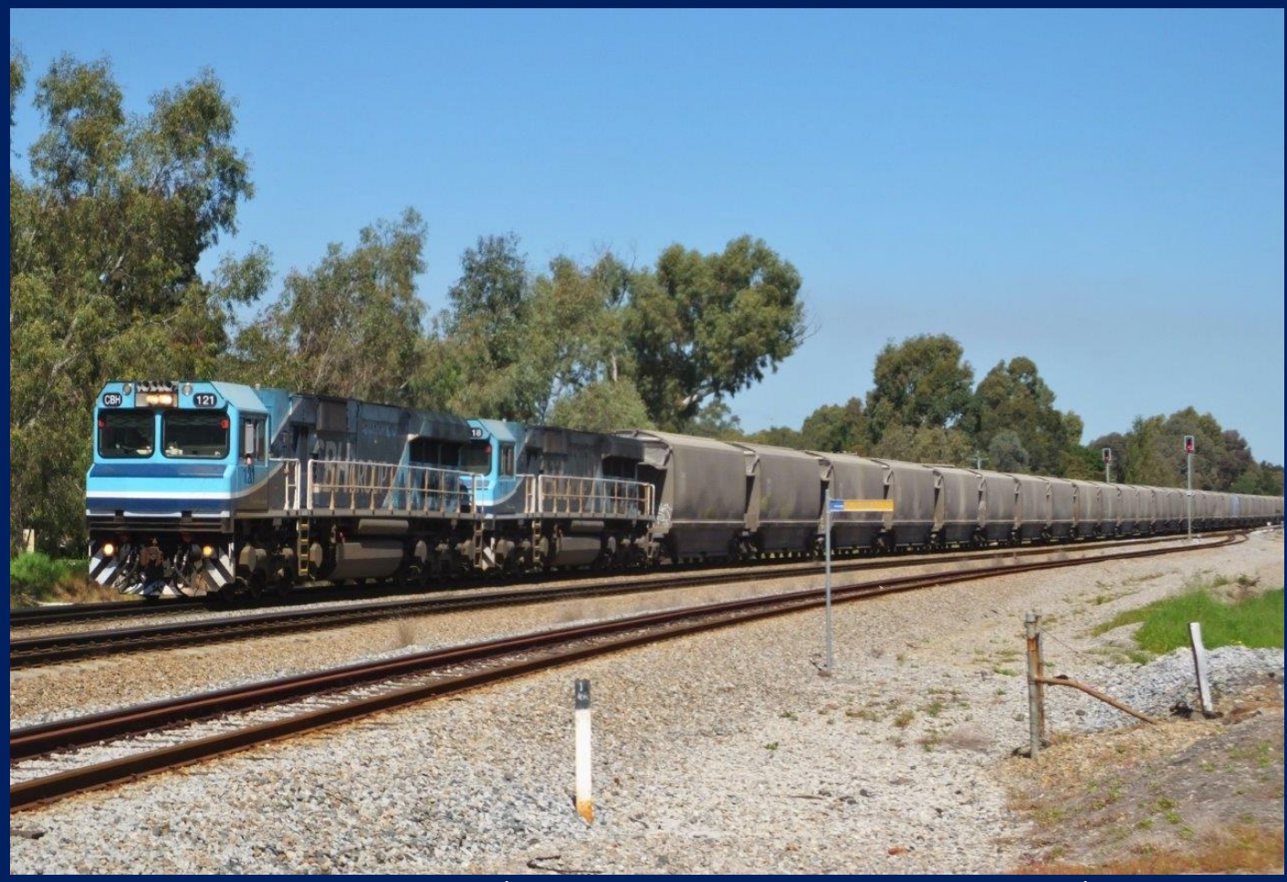
CBH121 & CBH118 on 7S55 empty Watco/CBH grain wrong line running at Woodbridge 13/9.