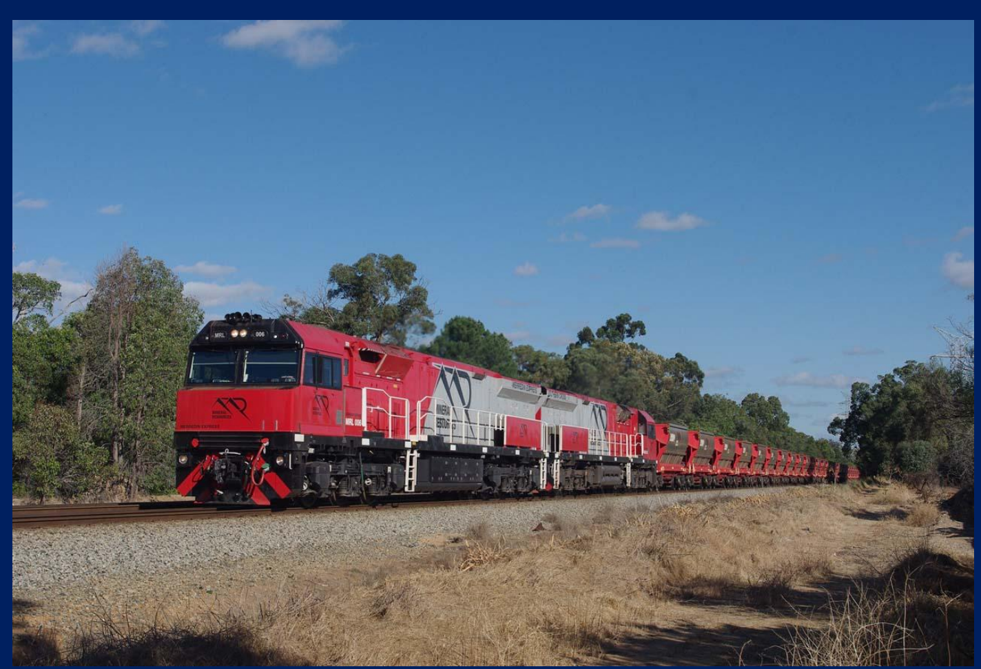
MRL006 on its first run & MRL003 on 6035 empty ore at Swan View September 26th.