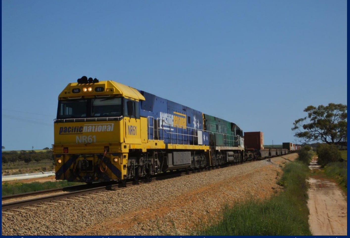
NR61 & NR85 on 1PS6 intermodal at Meckering September 14th.