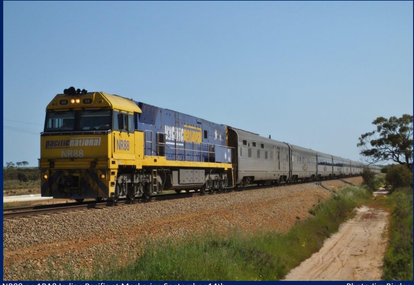
NR88 on 1PA8 Indian Pacific at Meckering September 14th.