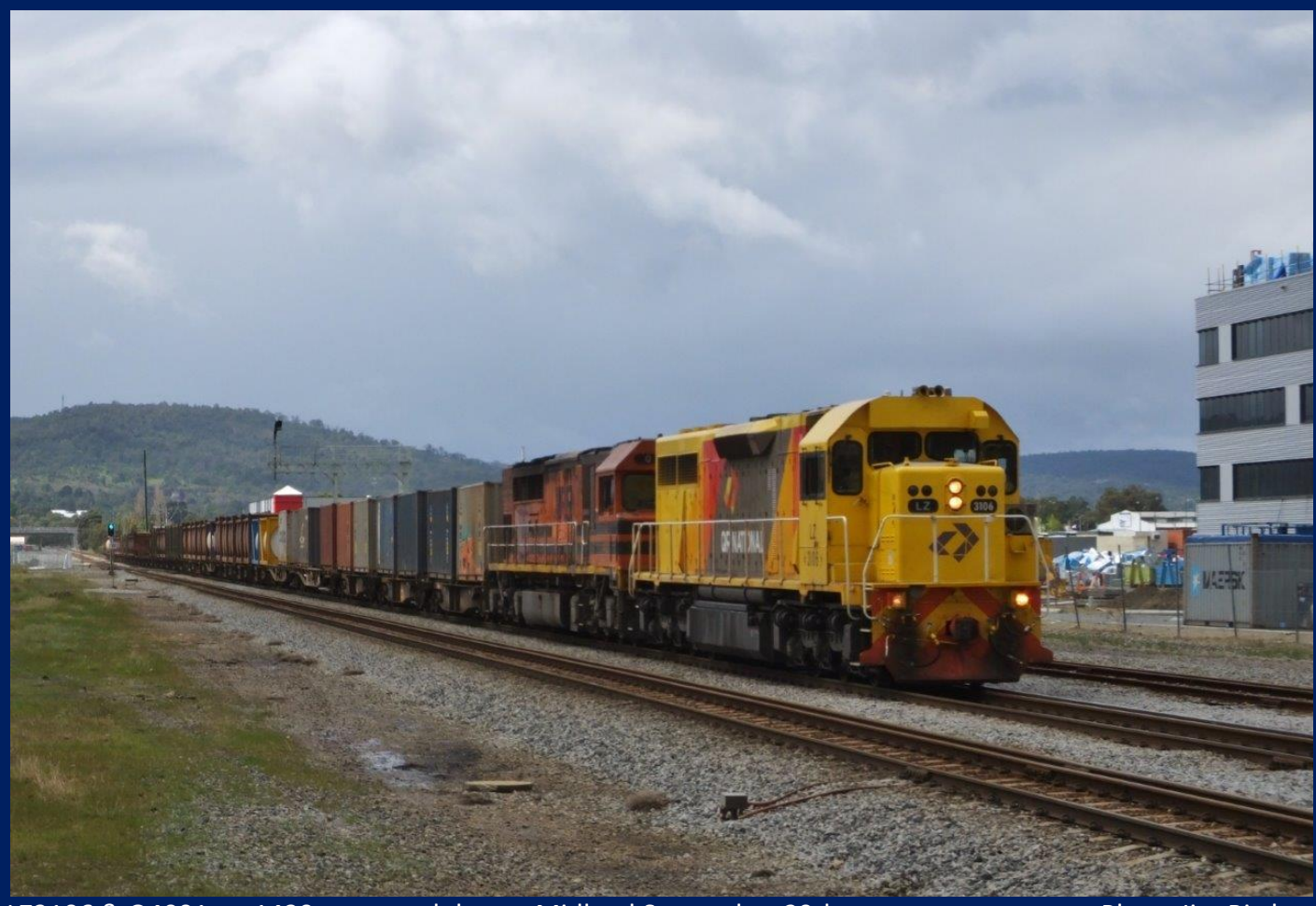
LZ3106 & Q4001 on 1430 empty sulphur at Midland September 29th.