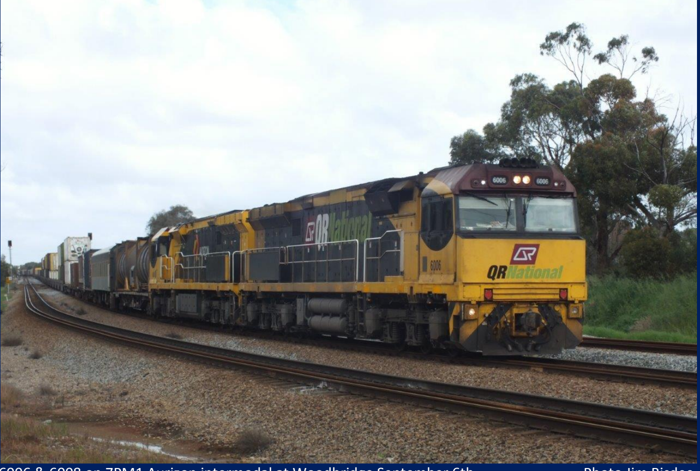
6006 & 6008 on 7PM1 Aurizon intermodal at Woodbridge September 6th.