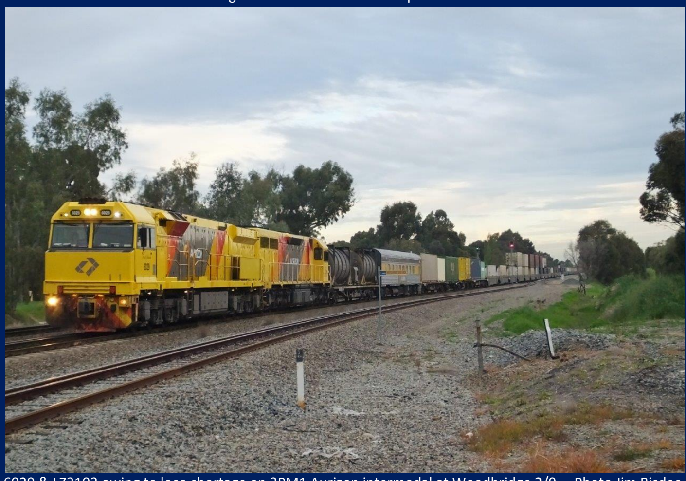
6029 & LZ3103 owing to loco shortage on 3PM1 Aurizon intermodal at Woodbridge 2/9.