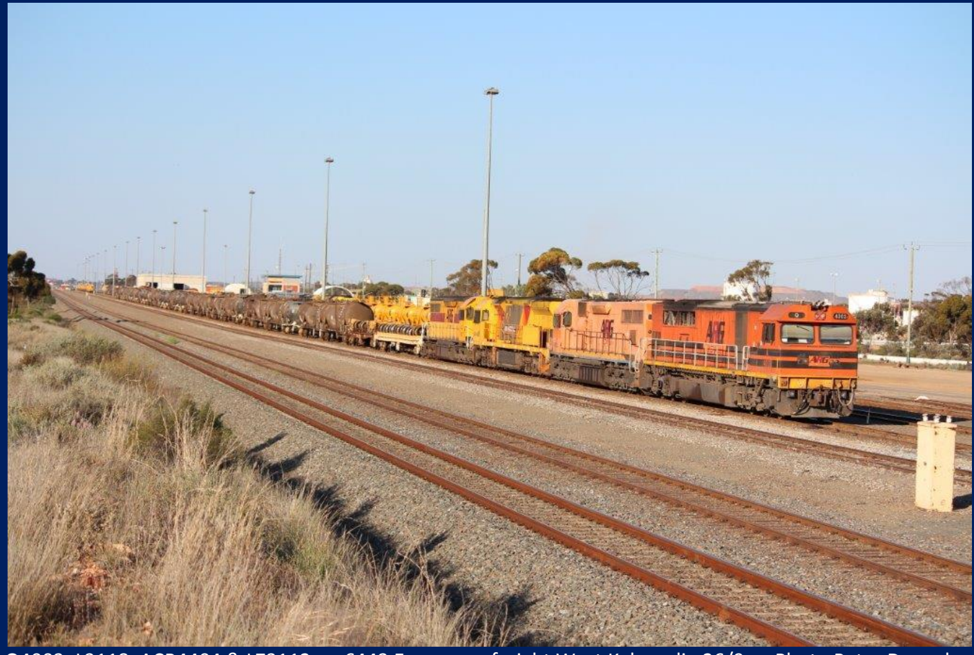
Q4003, L3118, ACB4404 & LZ3112 on 6443 Esperance freight West Kalgoorlie 26/9.