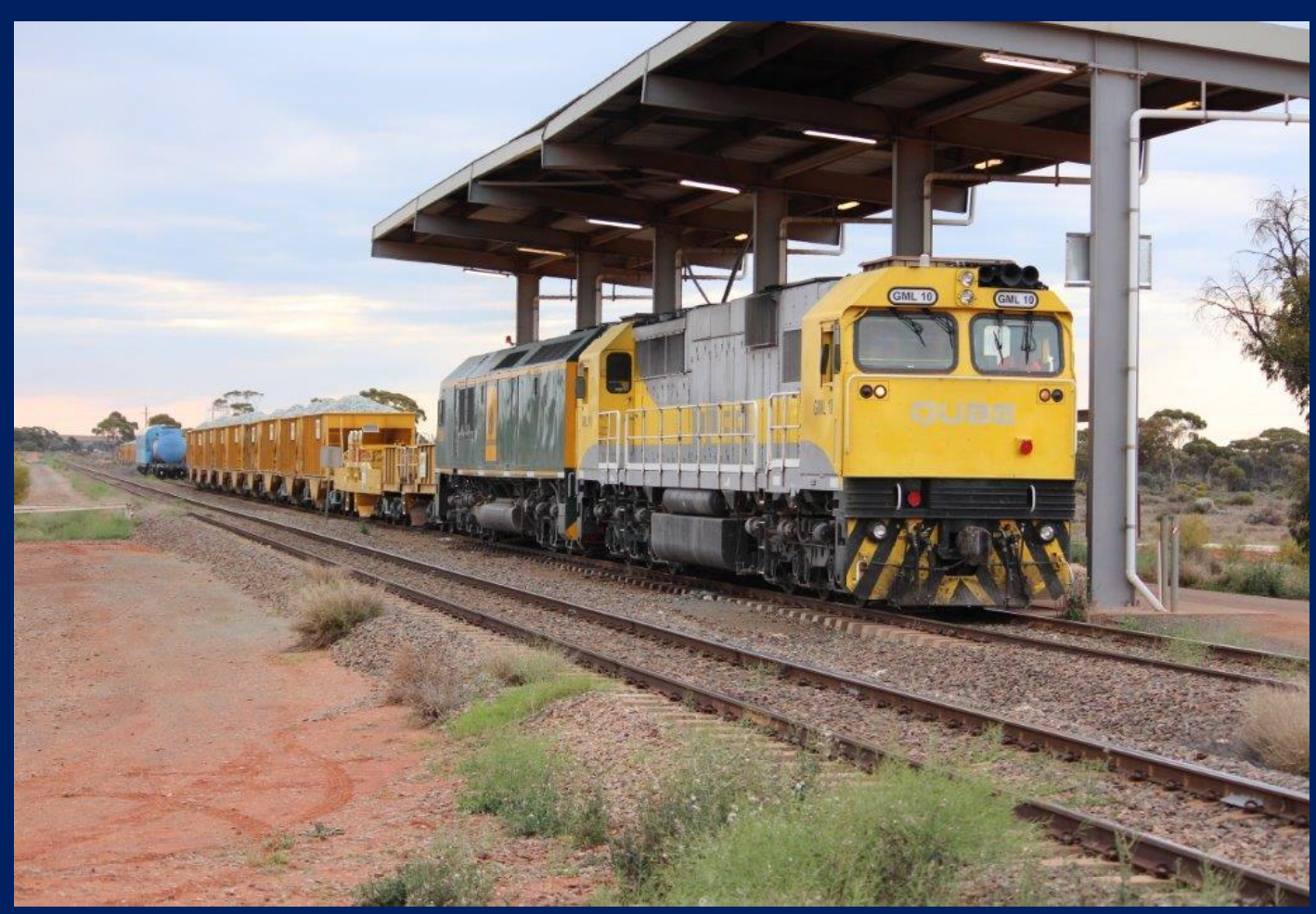
GML10 & RL306 on ballast train at eastern fuelling point Parkeston September 16th.