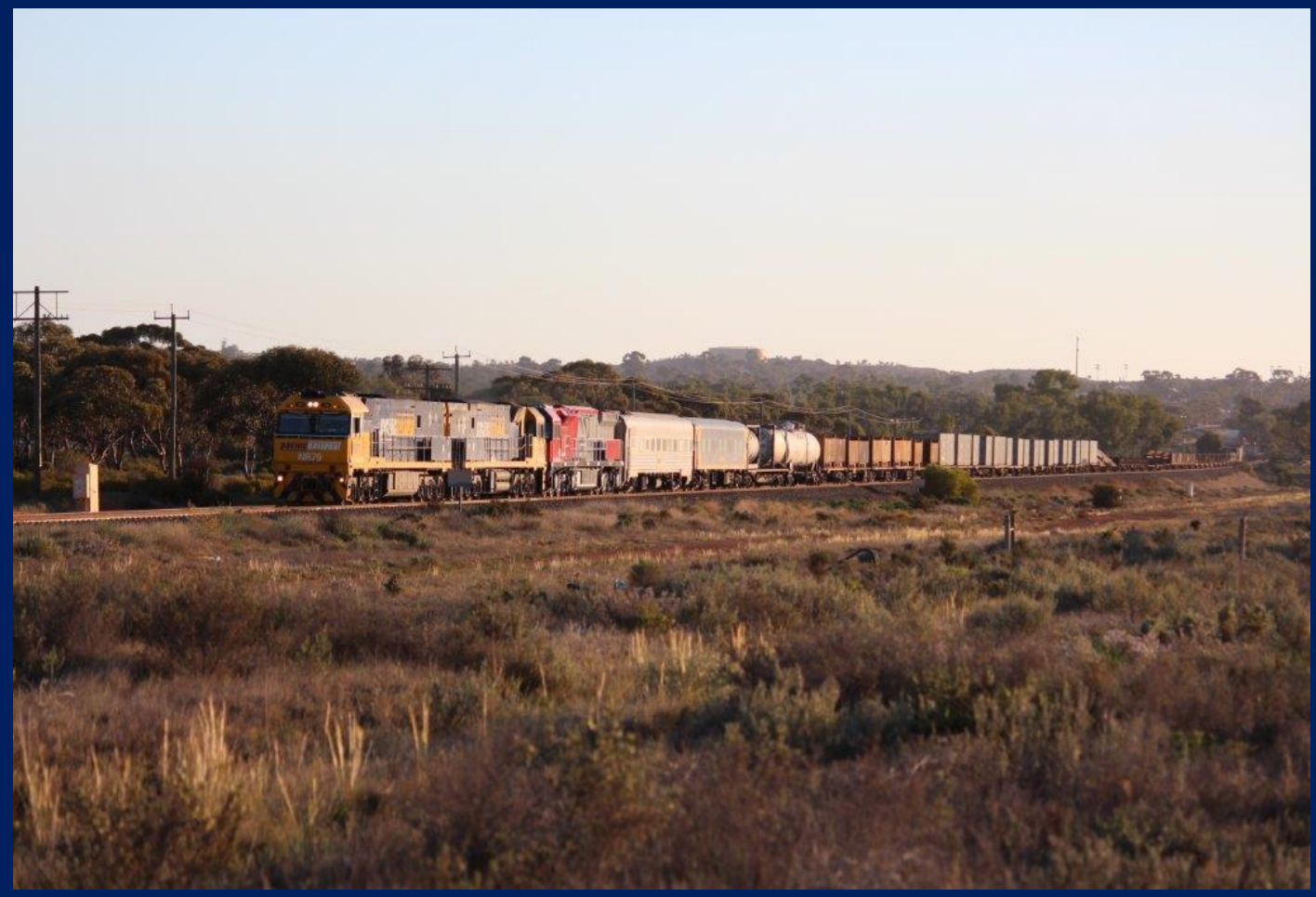
NR79, NR60 & dead attached MRL006 on 4WP2 at West Kalgoorlie September 14th.