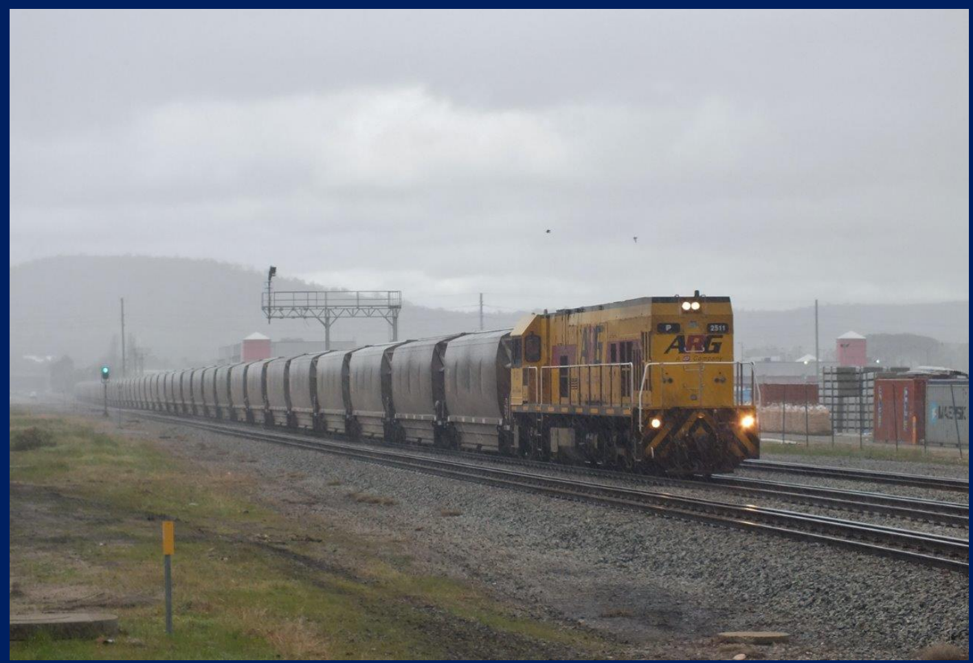
P2511 on 7K62 Watco/CBH grain with all CBHN wagons at Midland in rain September 6th.