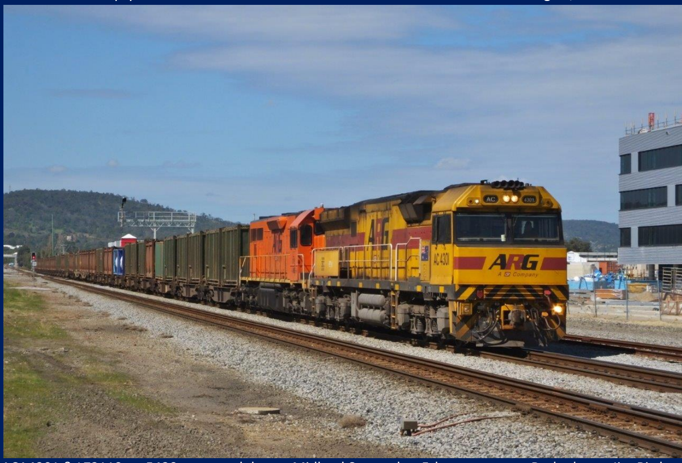
ACA4301 & LZ3119 on 5430 empty sulphur at Midland September 5th.