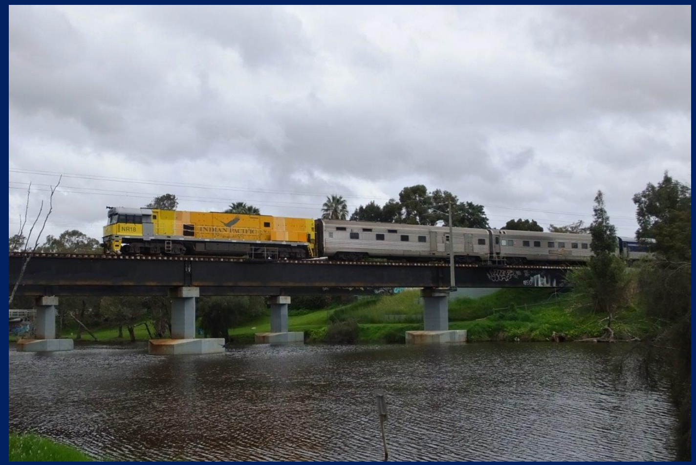
NR18 on 1PA8 Indian Pacific crossing Swan River at Guildford September 7th.