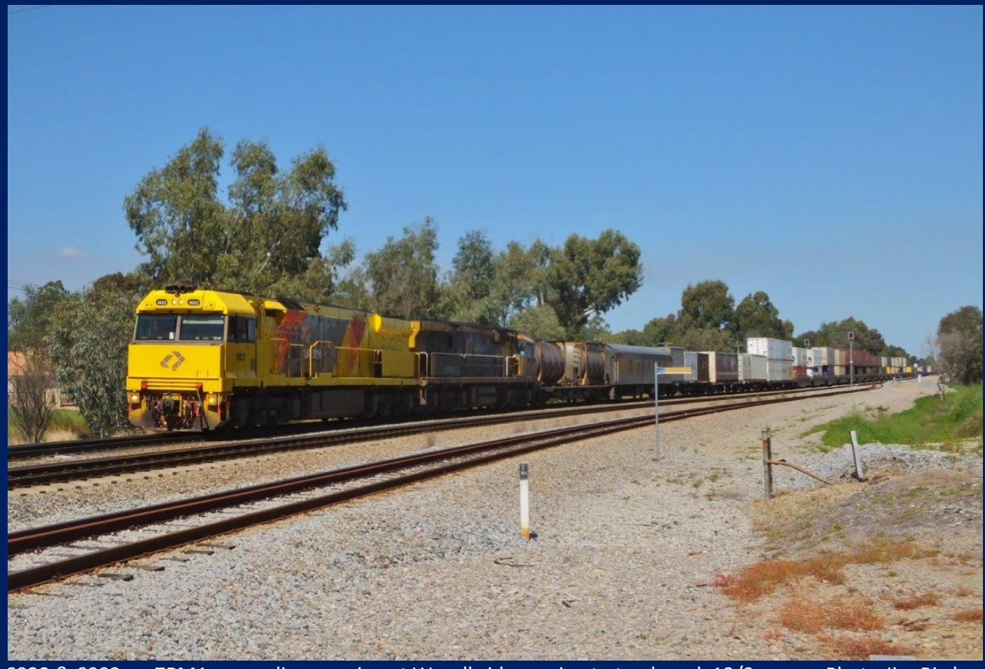
6022 & 6003 on 7PM1 wrong line running at Woodbridge owing to trackwork 13/9.