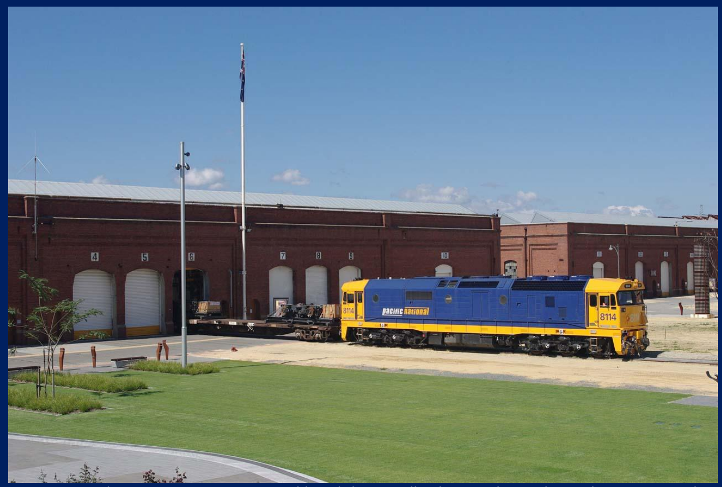
8114 on 6P31 shunting EMU set #101 into old workshops Midland September 12th.