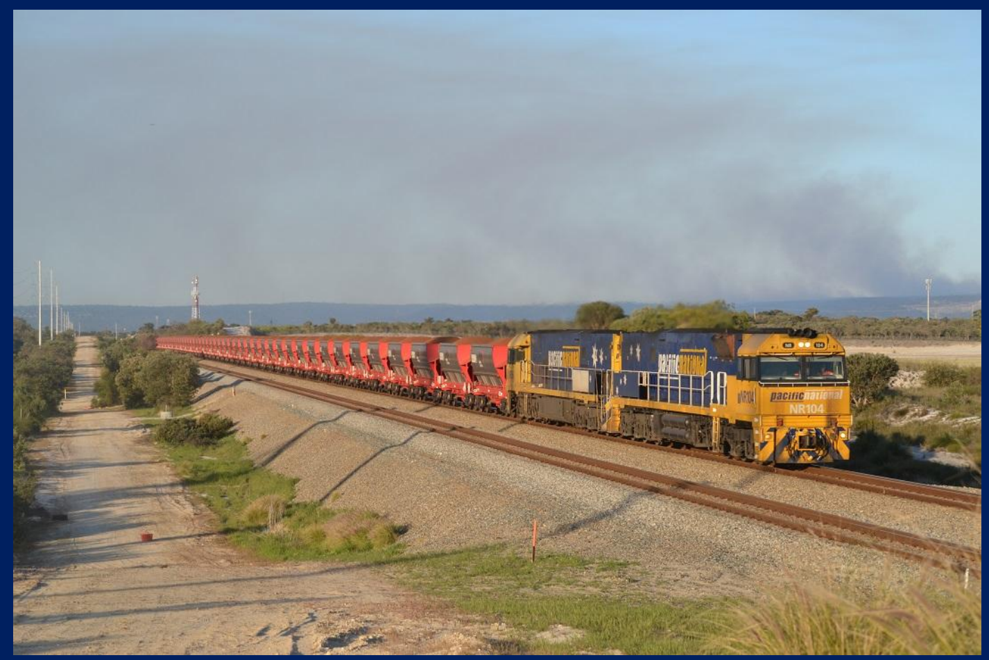
NR104 & NR56 on 3032 ore at Jandakot September 16th.