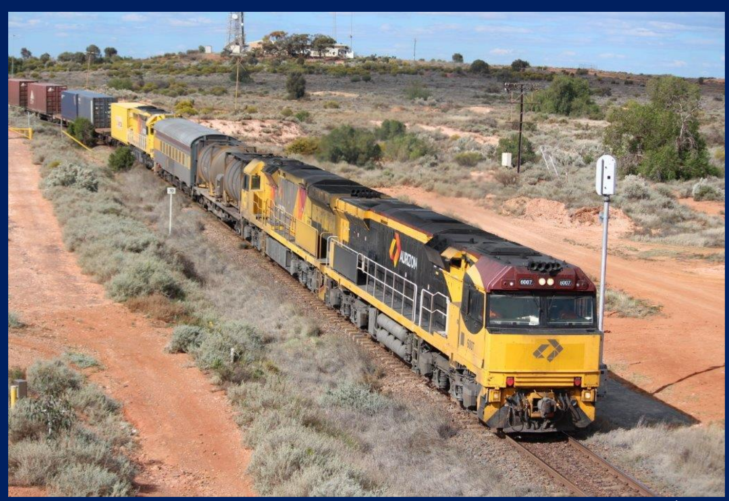
6007 & 6021 on 5MP1 Aurizon intermodal with LZ3103 dead behind crew car entering Kalgoorlie 07/09.