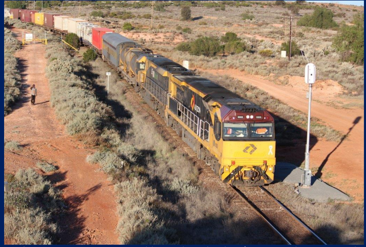
6008 & LDP004 on 5MP1 Aurizon intermodal approaching Kalgoorlie 20/9.