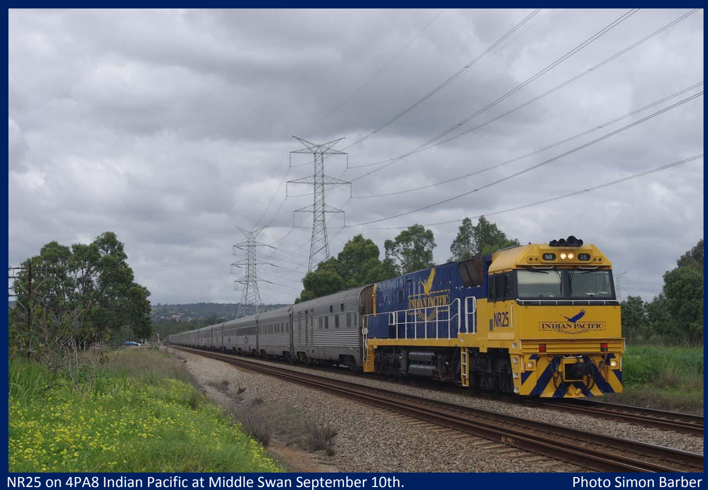
NR25 on 4PA8 Indian Pacific at Middle Swan September 10th.