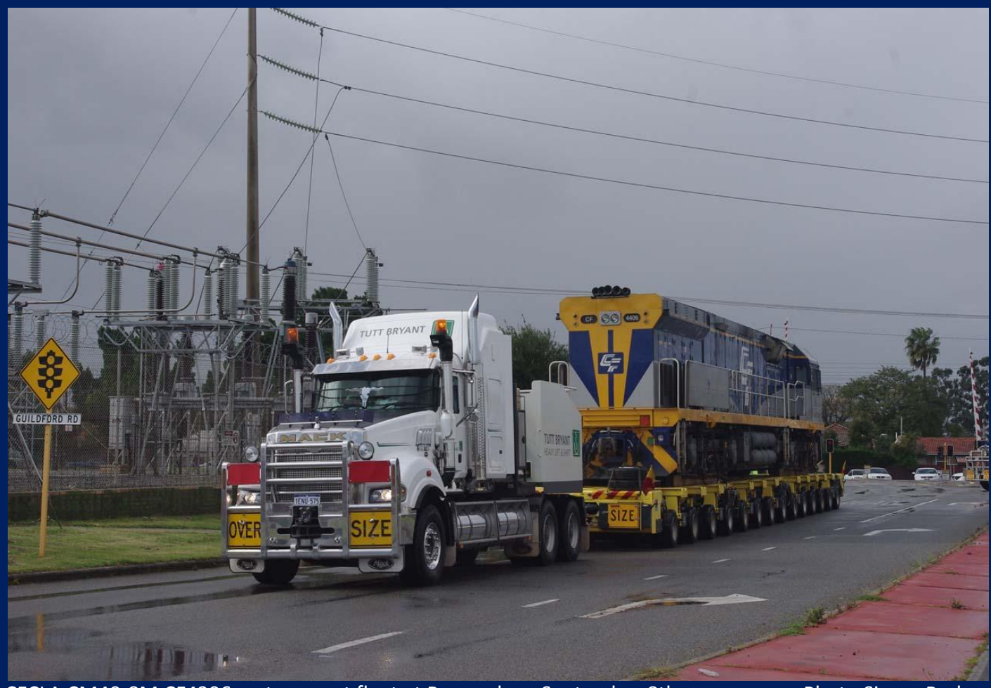
CFCLA CM40-8M CF4306 on transport float at Bassendean September 8th.