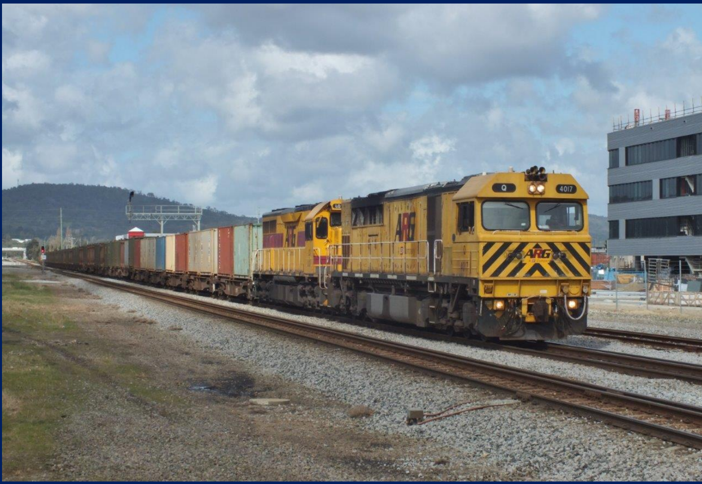
Q4017 & LQ3121 on late 6430 empty sulphur at Midland September 6th.