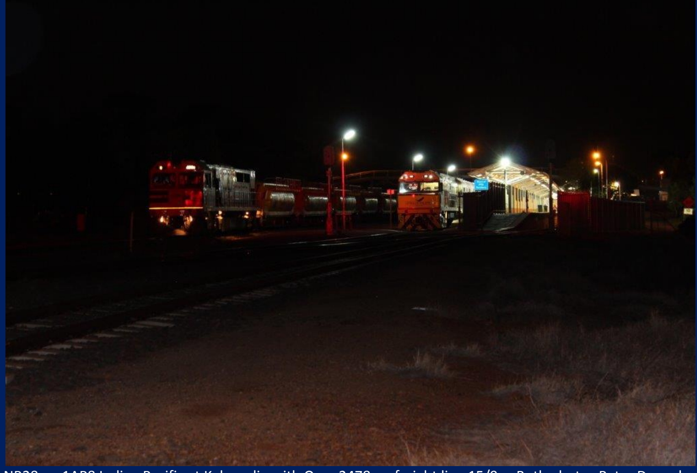
NR28 on 1AP8 Indian Pacific at Kalgoorlie with Q on 2478 on freight line 15/9.