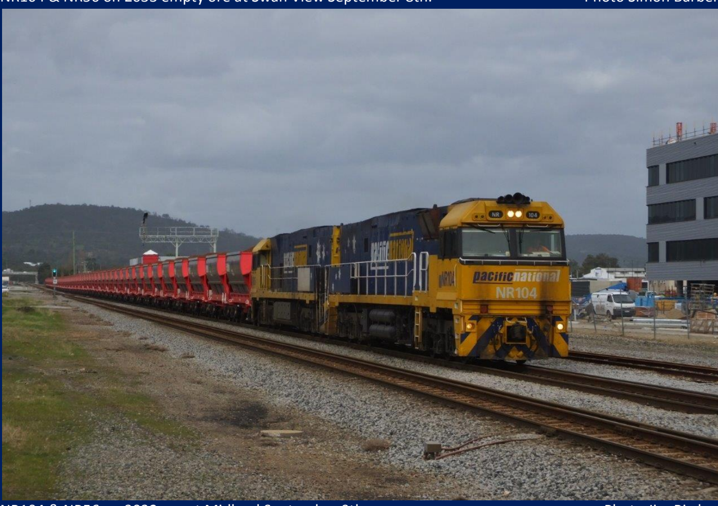
NR104 & NR56 on 3032 ore at Midland September 9th.