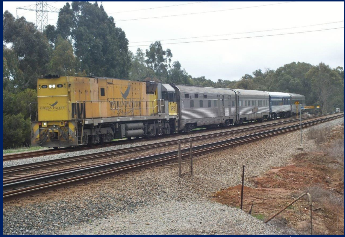
NR18 on 7003 empty Indian Pacific car movement East Perth to Kewdale at Woodbridge 6/9.