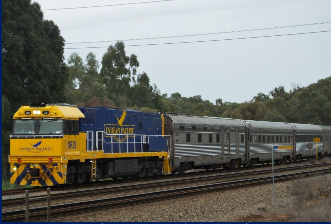
NR28 on 3003 empty Indian Pacific car movement to Kewdale at Woodbridge 2/9.