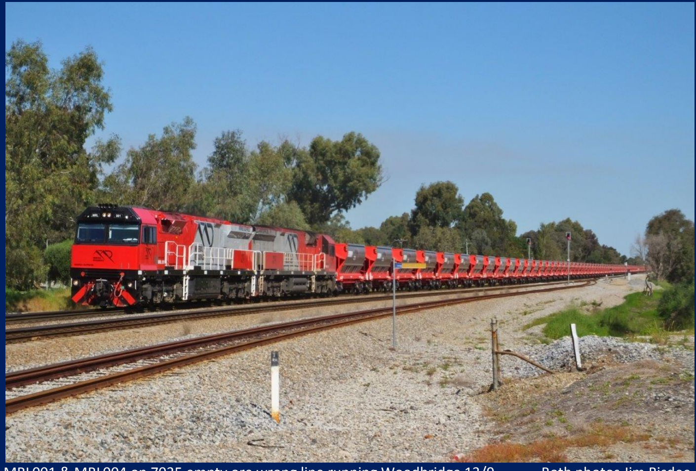
MRL001 & MRL004 on 7035 empty ore wrong line running Woodbridge 13/9.