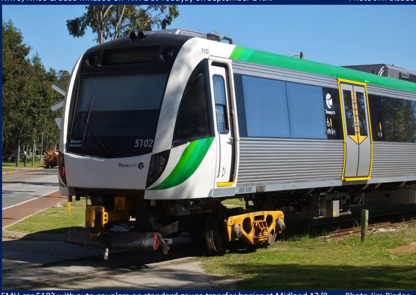
EMU car 5102 with auto couplers on standard gauge transfer bogies at Midland 12/9.