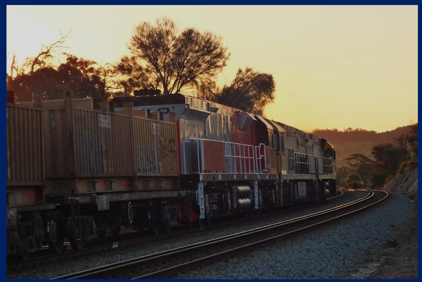
NR79, NR60 & dead MRL006 on 4WP2 at Toodyay on September 14th.