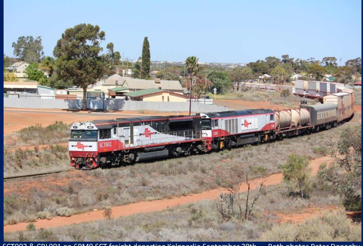
SCT002 & CRL001 on 6PM9 SCT freight departing Kalgoorlie September 28th.