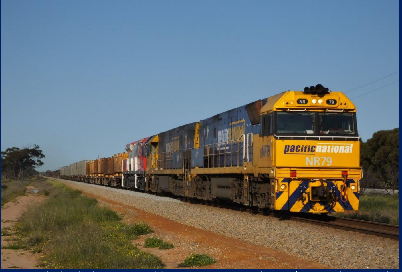
NR79, NR60 hauling dead MRL006 on its delivery run on 4WP2 at Cunderdin 14/9.