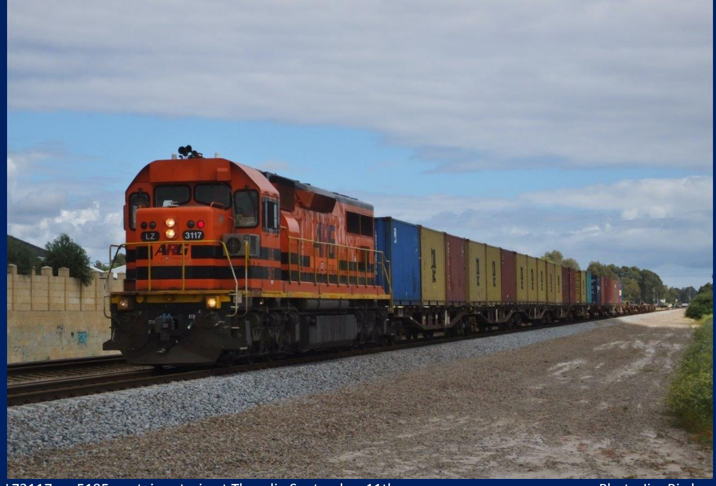
LZ3117 on 5195 container train at Thornlie September 11th.