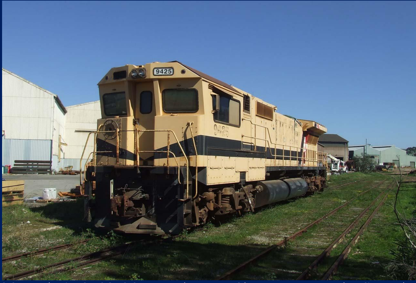
CFCLA ex Robe River CM40-8M 9425 at Bassendean August 16th.