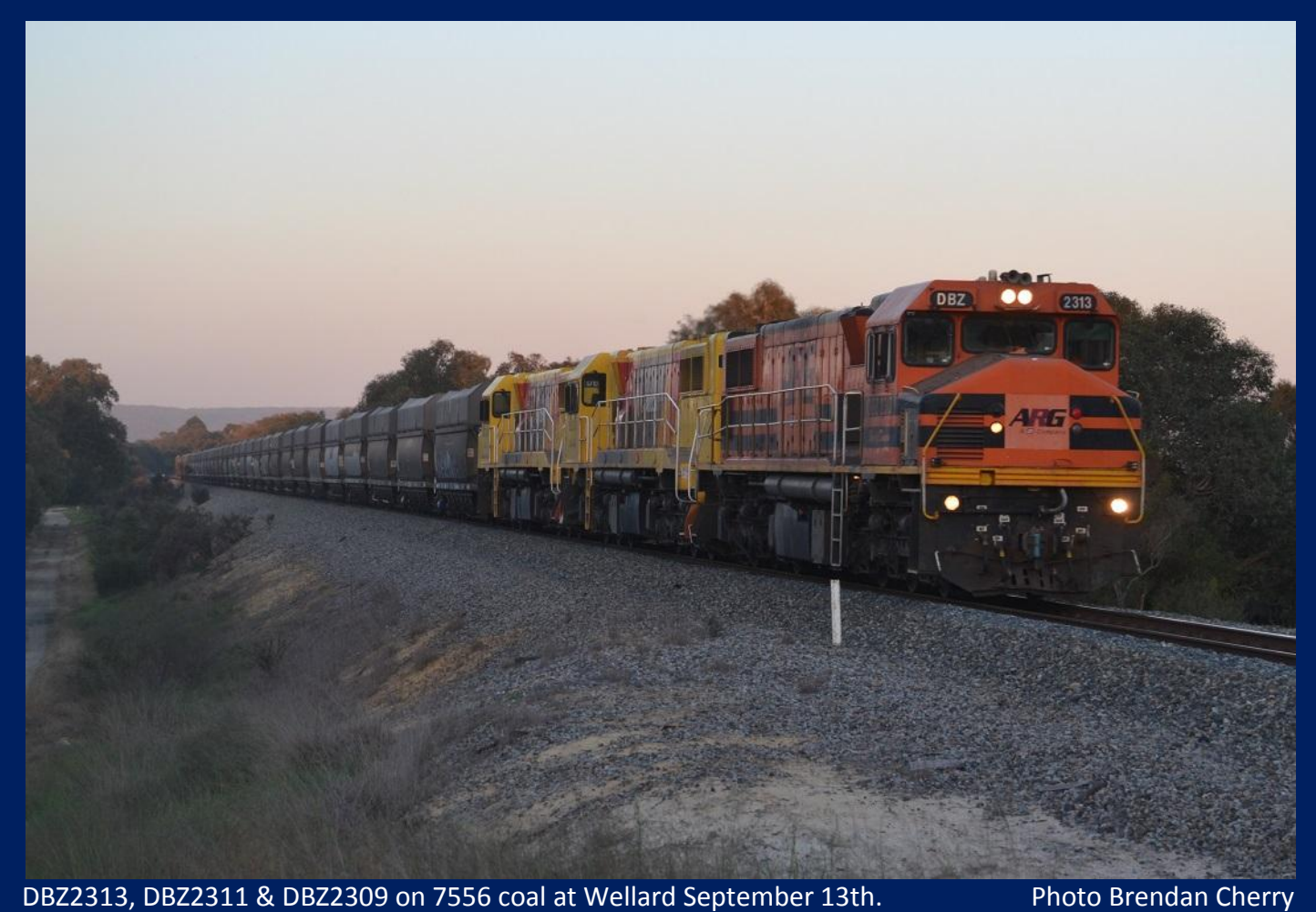
DBZ2313, DBZ2311 & DBZ2309 on 7556 coal at Wellard September 13th.