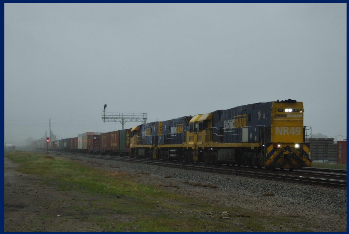
NR49 long end, NR113 & NR83 on very late 5SP5 in rain at Midland September 21st.